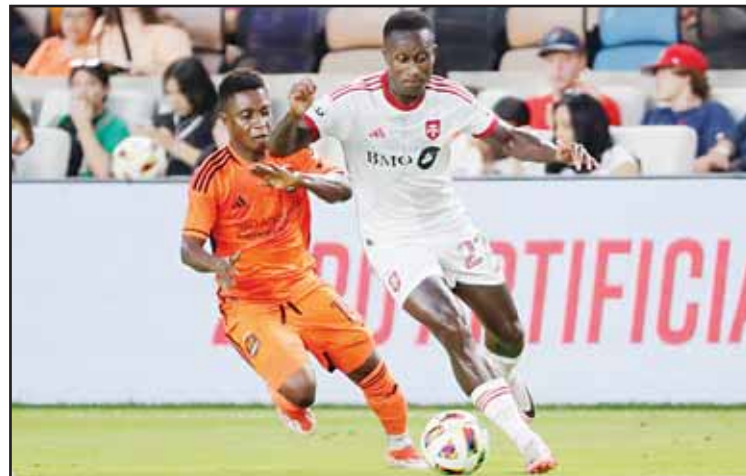
Toronto FC midfielder Richie Laryea, right, moves the ball in front of Houston Dynamo forward Latif Blessing, left, during the first half of an MLS soccer match in Houston.

Inter Miami (17-4-5) avenged a 6-1 drubbing in Cincinnati earlier this season and moved eight points ahead of second-place Cincinnati (15-8-3) in the Eastern Conference and in the Supporters' Shield race.