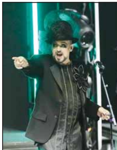
Boy George performs at YouTube Theater on Thursday, Aug. 22, in Inglewood, Calif.

LOS ANGELES: DJ and dance producer Zedd is back with an album after nearly a decade, "Telos." The first single is the appropriately titled "Out of Time" featuring Bea Miller , a dreamy tune with atmospheric strings that builds into a dancefloor banger. Zedd has revealed that he started writing "Out of Time" way back in 2015 but was never able to finish it. That changed with Bea - "her voice added an emotional depth that completed the song. 'Out of Time' really encapsulates the DNA of the Telos album, which is why I chose it to be the song that introduces this new era," he says.