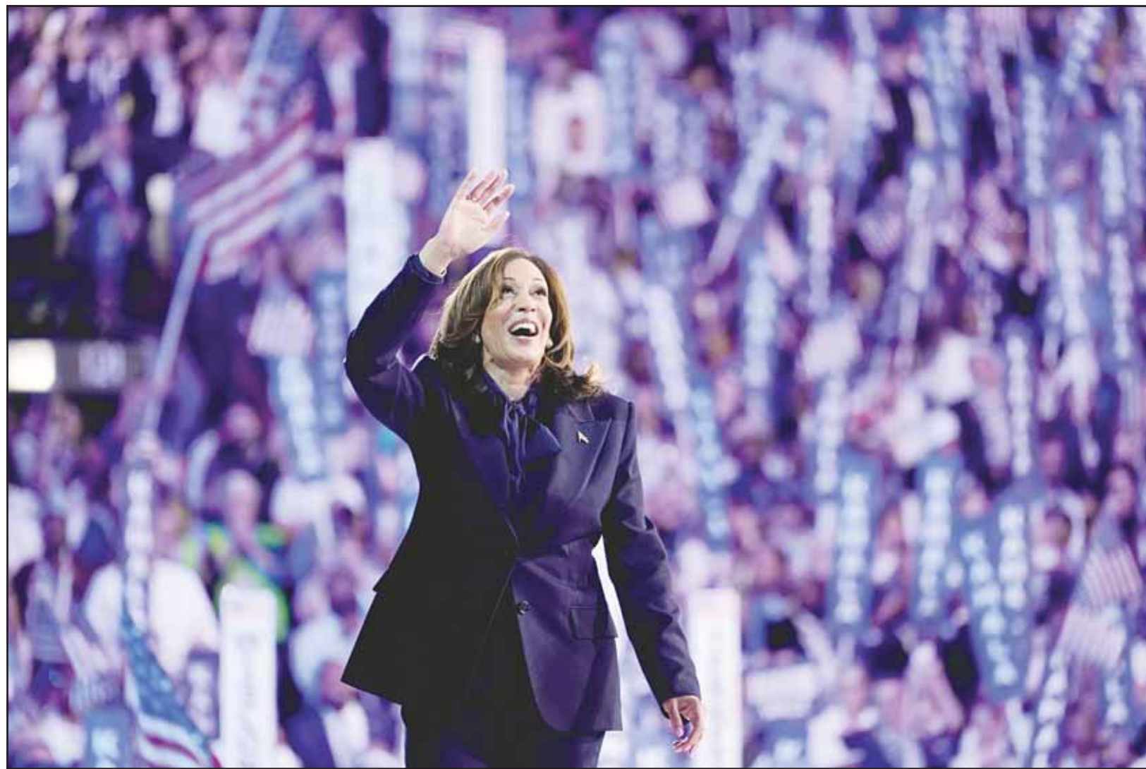
US Democratic presidential nominee Vice President Kamala Harris during the Democratic National Convention on Aug 22, in Chicago.

There's no rulebook that requires Macron to name a candidate from the party that won the most seats, or lays out a timeline for a decision.