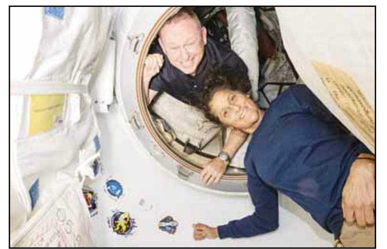
In this photo provided by NASA, Boeing Crew Flight Test astronauts Butch Wilmore, (left), and Suni Williams pose for a portrait inside the vestibule between the forward port on the International Space Station's Harmony module and Boeing's Starliner spacecraft on June 13, 2024.

Boeing did not participate in Saturday's news conference by NASA, but released a statement: "Boeing continues to focus, first and foremost, on the