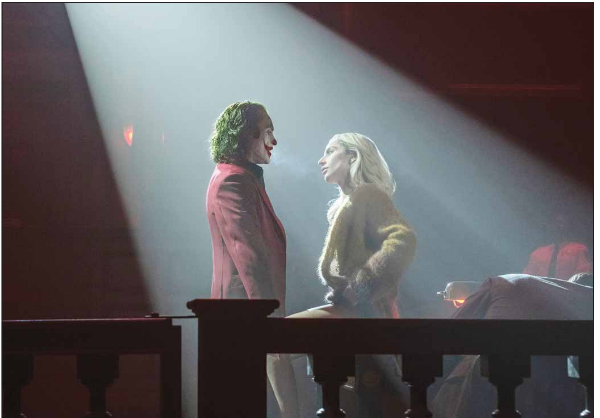
This image released by Warner Bros. Pictures shows Joaquin Phoenix, (left), and Lady Gaga in a scene from 'Joker: Folie à Deux,' which is among the films competing for this year's Golden Lion at the Venice Film Festival running from Aug 28 to Sept 7.