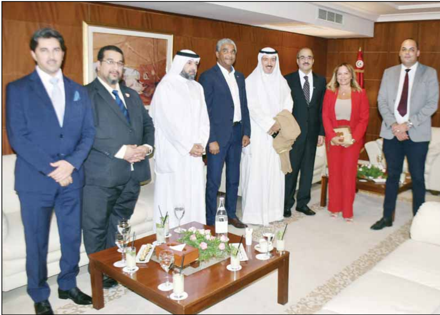
Officials pose for a group photo after the end of the championship.