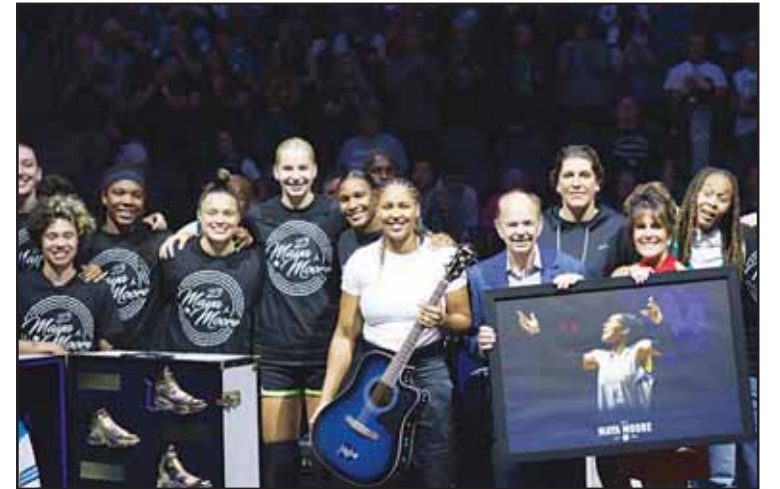
Former Minnesota Lynx player Maya Moore Irons, center, Lynx and Timberwolves owner Glen Taylor, and Moore's former teammates pose for a photograph after her jersey is retired following the WNBA basketball game between the Lynx and the Indiana Fever in Minneapolis.

Ionescu connected on a deep 3-pointer right before the half to make it 40-38 at the break.