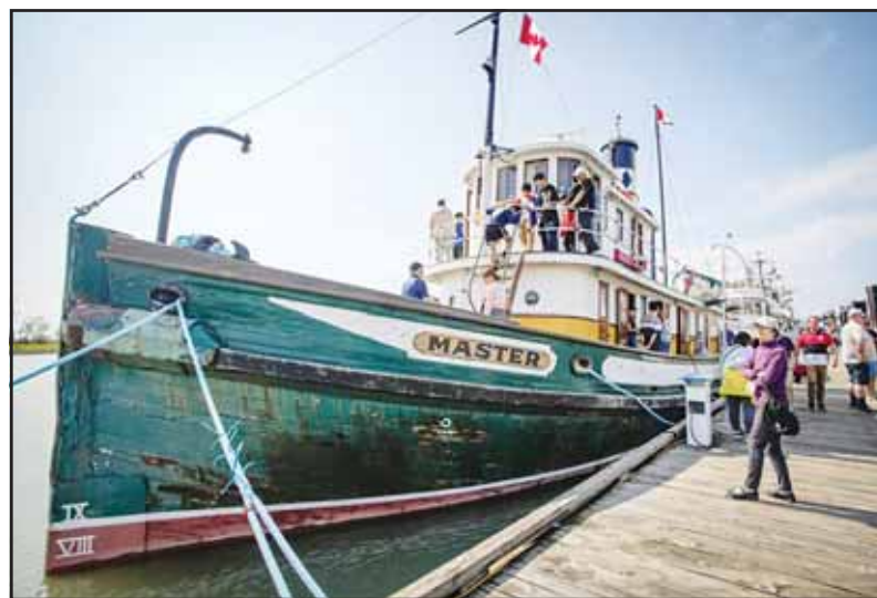
Visitors explore various ships on display at the dock during the 21st annual Richmond Maritime Festival in Richmond, British Columbia, Canada, on Aug 24. The two-day event kicked off on Saturday.