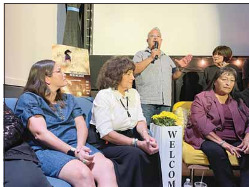
New Mexico Sen. Leo Jaramillo, (center), is flanked by panelists and downwinders as they discuss the film "First We Bombed New Mexico" during the Oppenheimer Film Festival in Los Alamos, New Mexico on Saturday, Aug. 17, 2024. Advocates have been pushing for the reauthorization and expansion of the Radiation Exposure Compensation Act, saying the government has failed for decades to acknowledge New Mexico downwinders and people in other states exposed to radiation as a result of the government's nuclear weapons work. — Details Page 11

introductory lesson. However, it sparked a dream of flying around the world. He first completed high school early and then began preparing for his journey.