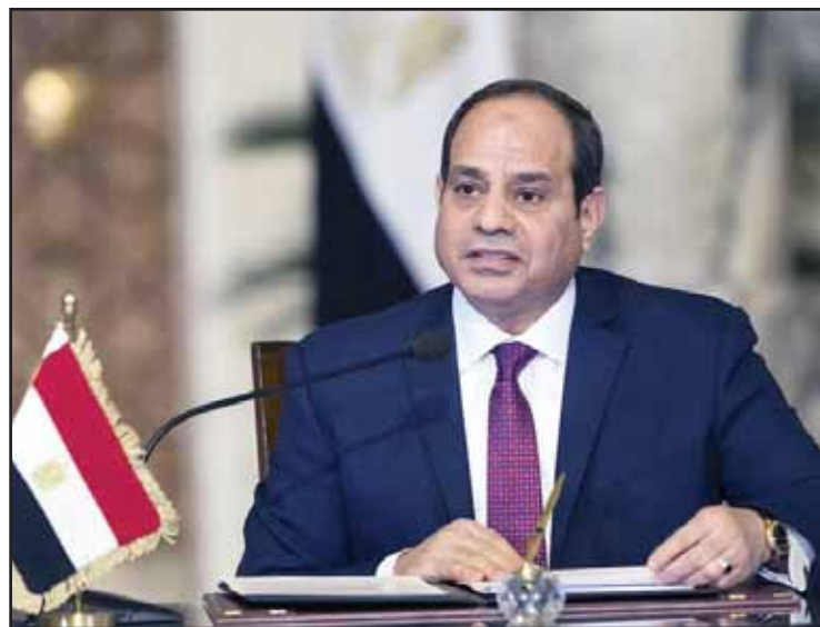
Egyptian President Abdel Fattah El-Sisi

According to field reports from the IOM, the vessel, which had embarked from Djibouti, was carrying 25 Ethiopian migrants and two Yemeni nationals when it capsized on Tuesday near the Dubab district in Bani Al-Hakam sub-district. (Xinhua)