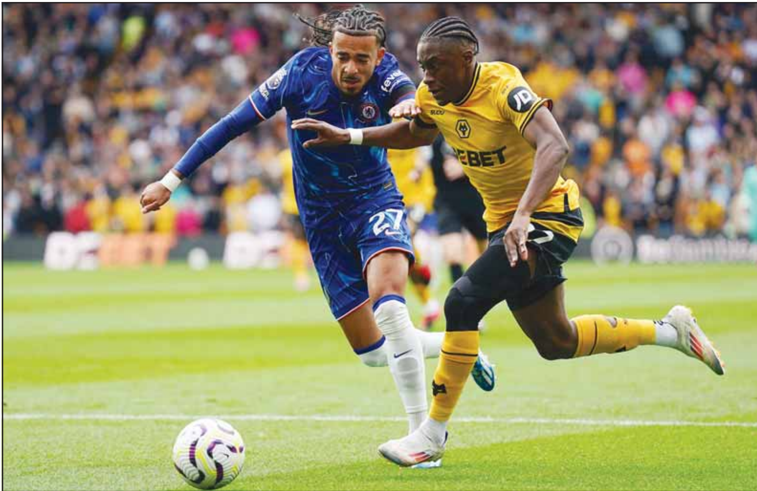
Wolverhampton Wanderers' Jean-Ricner Bellegarde, right, and Chelsea's Malo Gusto battle for the ball during the English Premier League soccer match between Wolverhampton Wanderers and Chelsea at Molineux Stadium, Wolverhampton, England.