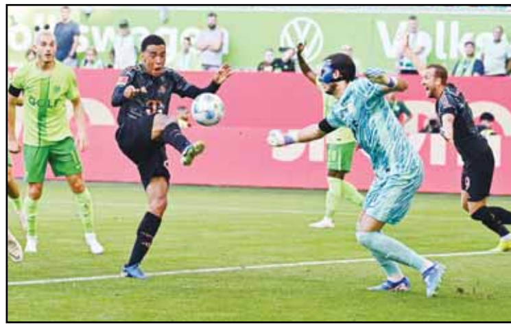
Bayern's Jamal Musiala, second left, in action against Wolfsburg goalkeeper Kamil Grabara during the German Bundesliga soccer match between VfL Wolfsburg and FC Bayern Munich at the Volkswagen Arena in Wolfsburg, Germany.

Müller was involved again when Gnabry scored the winner in the