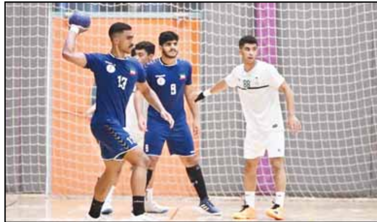
A file photo of Kuwaiti players in action.

The Blues have been preparing for the Asian Championship through an external training camp held in Slovenia in recent weeks.