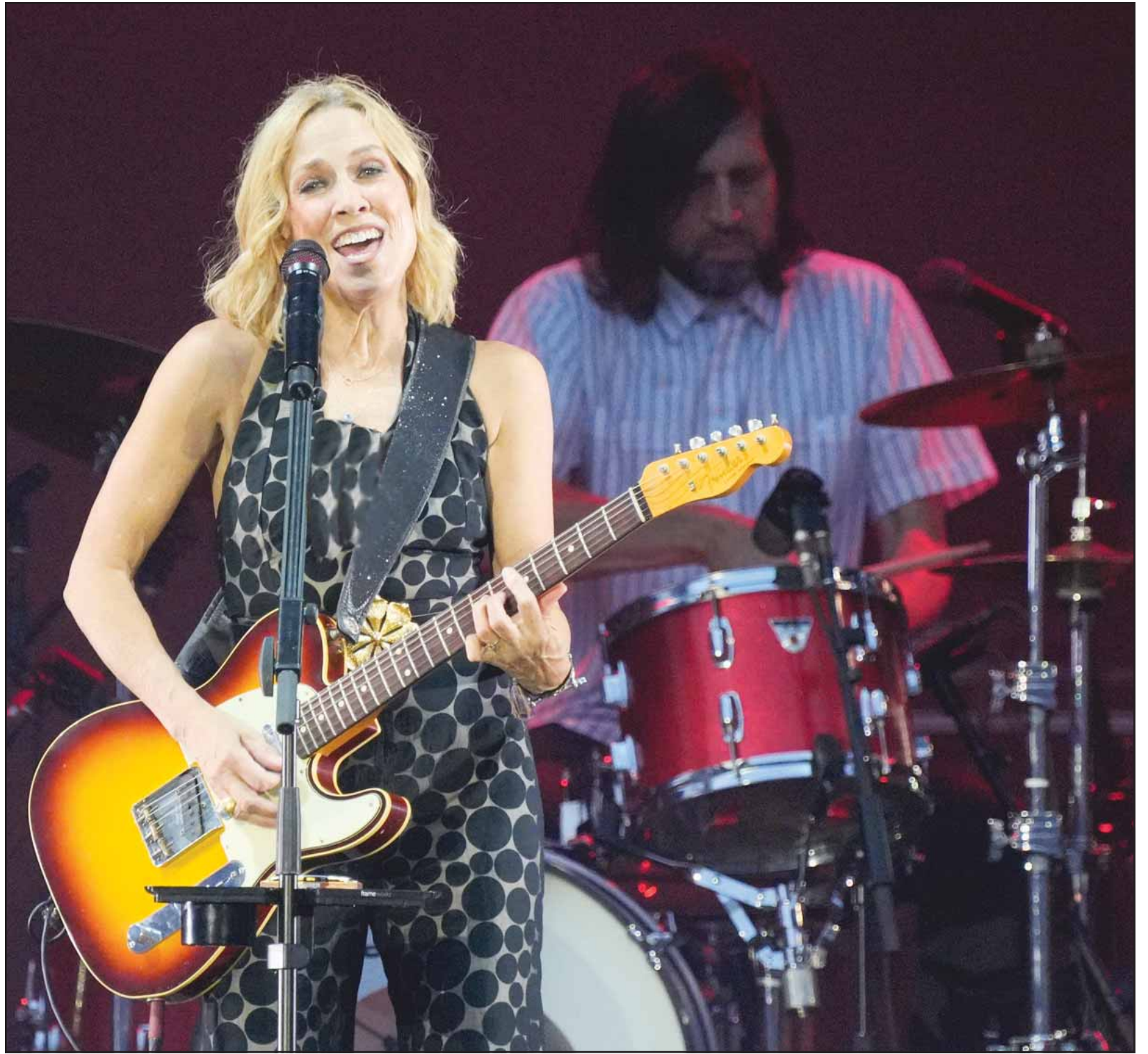
Sheryl Crow performs in concert at Soldier Field on Saturday, Aug. 24, in Chicago.