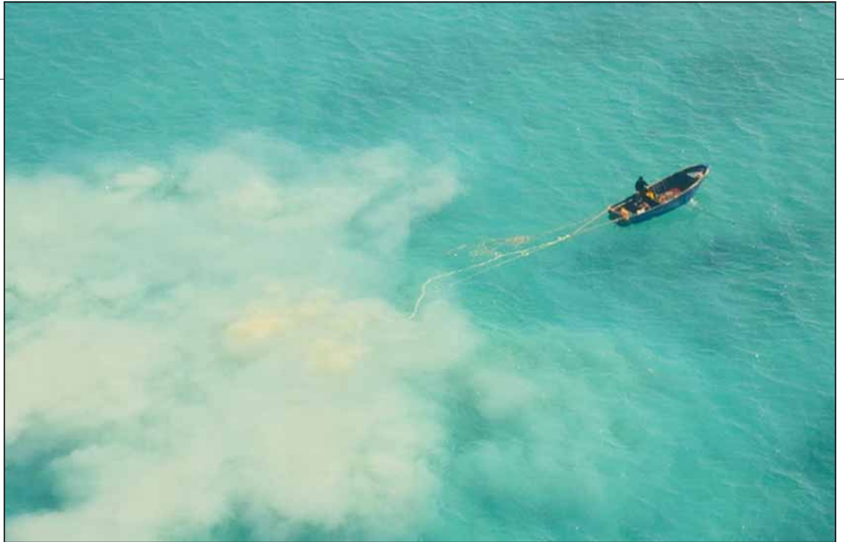
In this photo provided by the Philippine Coast Guard, a Chinese service boat scours the seabed as they search for giant clams in the Scarborough Shoal, at the disputed South China Sea, on April 22, 2019.

The navy also seized a trawler that the Indians were traveling in, the statement said, adding that the trawler and Indian fishermen were handed over to the local authority for legal proceedings.