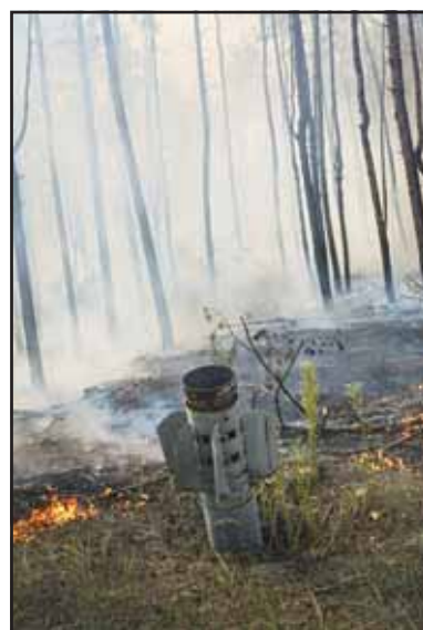
MSLR rocket stick is seen on the ground in a forest fire after a Russian strike near Sloviansk, Donetsk region, Ukraine, on Aug 24.

"Just before Vice President Harris' acceptance speech Thursday night, we officially crossed the $500 million mark," campaign chair Jen O'Malley Dillon wrote in a memo released by the campaign on Sunday. "Immediately after her speech, we saw our best fundraising hour since launch day."