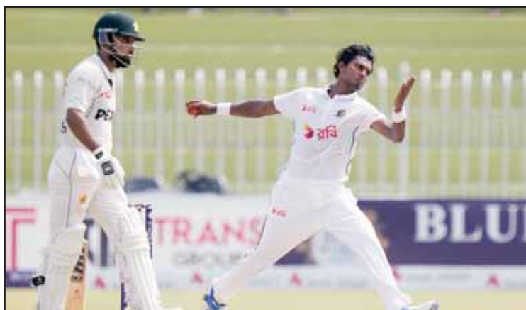
Bangladesh's Hasan Mahmud, right, bowls as Pakistan's Abdullah Shafique watches during the fifth day of first cricket test match between Pakistan and Bangladesh, in Rawalpindi, Pakistan.

Earlier, in a dramatic first session Bangladesh set up its victory as Pakistan limped to 108-6 and lost five wickets. Captain Shan Masood (14)