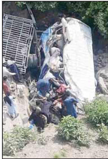
Volunteers recover bodies and rescue wounded passengers from a damaged bus that fell into a ravine, near Kahuta, Pakistan on Aug 25. Two separate bus accidents hours apart in Pakistan on Sunday left at least 36 people dead and dozens more injured, officials said. (AP)

"The responsibility is totally on the Philippines' side. We sternly warn that the Philippine side must immediately stop the infringement and provocation, otherwise it must bear all consequences," he said. Gan did not elaborate on what control measures the Chinese coast guard took. (AP)