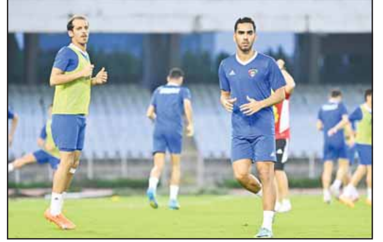
Kuwait continues its daily training in Dubai.

DUBAI, Aug 25: The Kuwait senior soccer team is continuing its training regimen with sessions scheduled twice a day. Morning sessions are held in the hotel gym, focusing on muscle relaxation and strengthening exercises, while evening sessions take place at the Police Officers Club stadium in Dubai, UAE. The team will remain in Dubai for its training camp until September 2, before departing for Amman, where it will