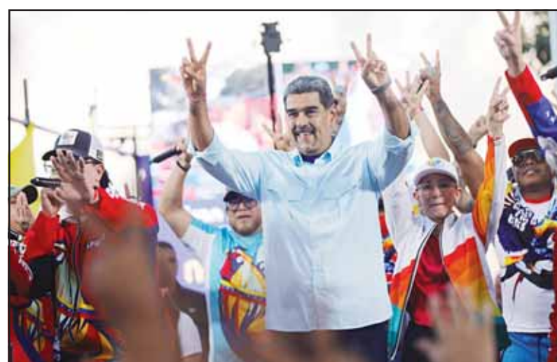
Venezuelan President Nicolas Maduro flashes the victory sign at supporters during a pro-government rally, in Caracas, Venezuela on Aug 17. The European Union's top diplomat on Aug 24 said that Maduro has still "not provided the necessary public evidence" to prove he was the winner of July's elections, days after the country's Supreme Court backed the government's disputed claims of victory. (AP)

Then-Bangladesh Prime Minister Sheikh Hasina ordered border guards to open the border, eventually allowing more than 700,000 refugees to take shelter in the Muslim-majority nation. The influx was in addition to the more than 300,000 refugees who had already been living in Bangladesh for decades in the wake of waves of previous violence perpetrated by Myanmar's military. (AP)