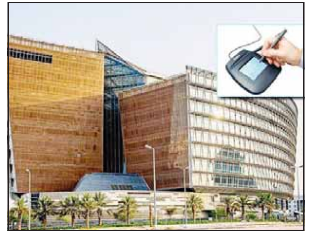
The Ministry of Education headquarters; (inset) a sample of an electronic signature system.

The introduction of the electronic signature system is expected to significantly reduce reliance on paper correspondence, streamline the approval process for signatures by Ministry officials, and enhance overall workflow efficiency, leading to faster completion of tasks.