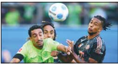
Wolfsburg's Tiago Tomas, left, in action against Bayern's Michael Olise during the German Bundesliga soccer match between VfL Wolfsburg and FC Bayern Munich at the Volkswagen Arena in Wolfsburg, Germany.