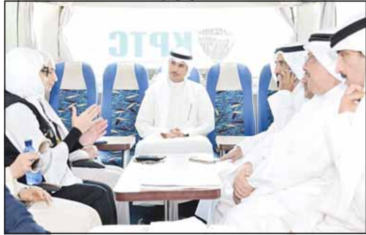
Part of the visit by the Ahmadi Governor Sheikh Hamoud Jaber Al-Ahmad and other government officials to the Shaddadiya Industrial City project.

The bureau revealed that the weak internal control procedures in all departments in charge of employee and financial affairs, and the failure to activate the automated link between the educational districts and head office of the ministry resulted in the unlawful disbursement of salaries amounting to KD972,000 during the aforementioned fiscal year. It asserted that the illegally disbursed salaries and allowances are recorded as debts; hence, the need to tighten control over salaries and activate the automated link to protect public funds.