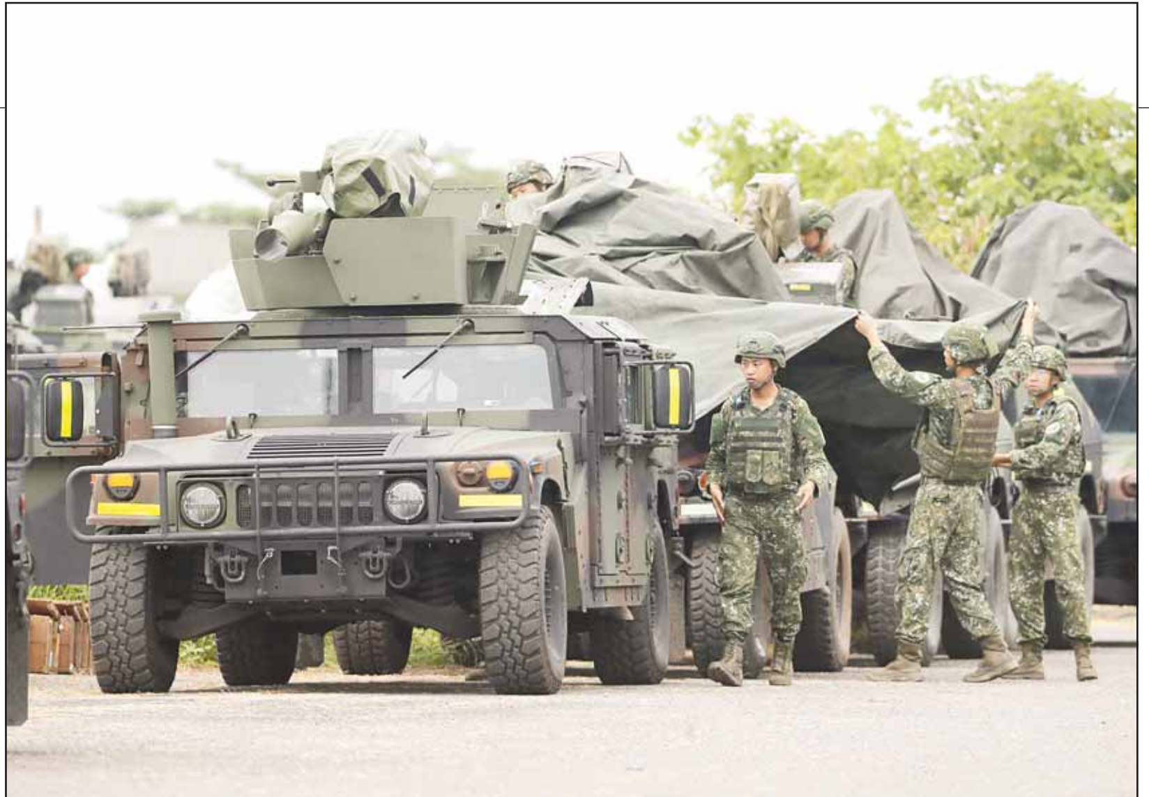
Soldiers cover M1167 HMMWV (High Mobility Multipurpose Wheeled Vehicle) anti-tank missile carriers during military drills in Pingtung County, southern Taiwan on Aug 26.

"I am confident in your level of training and professionalism. Be good ambassadors of the Republic of Kenya by maintaining a high sense of professionalism and discipline in all your undertakings and uphold the exemplary performance registered by your predecessors," Kapkory said in a statement issued in Nairobi, the capital of Kenya.