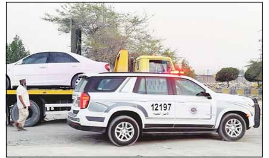
One of the abandoned cars being lifted on a trailer.

He stressed that the authority is always willing to cooperate with various State institutions in the interest of the public and to contribute to the advancement of the wheel of development.