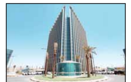
Public Authority for Applied Education and Training building.

Personal interviews are required for final admission, scheduled for Sept 16 and 17, 2024, for the College of Basic Education