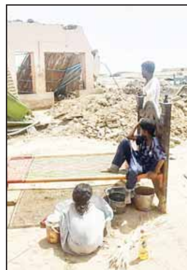
People sit in front of their home damaged by floods in Meroe, north of Khartoum, Sudan on Aug 20. Food aid is on the way to an area of Sudan facing famine amid the northeast African country's grinding conflict, a group of countries and the United Nations said in a joint statement on Aug 23.