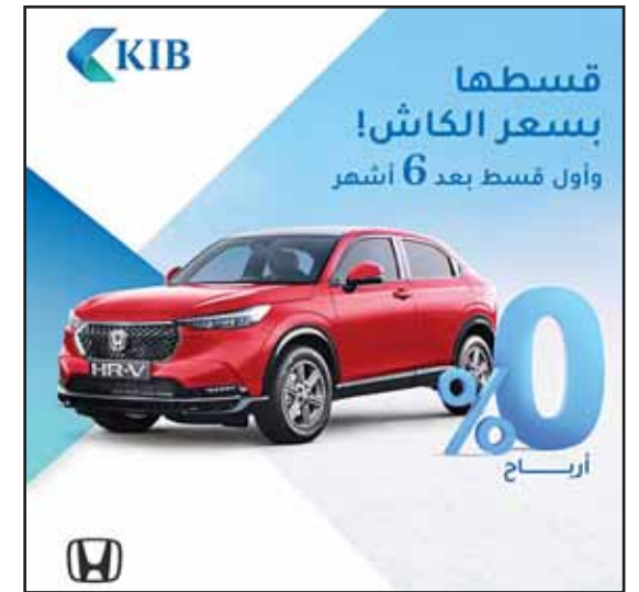
KIB's Honda Financing Offer.

It is worth noting that KIB offers its customers a more efficient and flexible shopping experience by enabling them to request and track financing easily and comfortably. The Bank provides flexible financing ranging from KD 300 to KD 25,000, payable over three to 60 months, without the need for salary transfer. This makes KIB the ideal choice for a wide range of customers and non-customers, both citizens