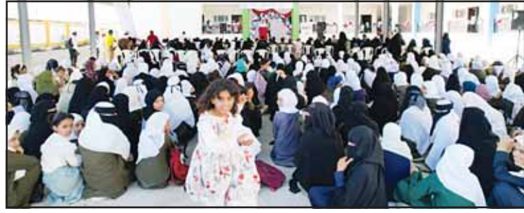
A thousand Yemeni female students benefit from Idris School, which was established and equipped with Kuwaiti funding.

Adjustments linked to employment start date