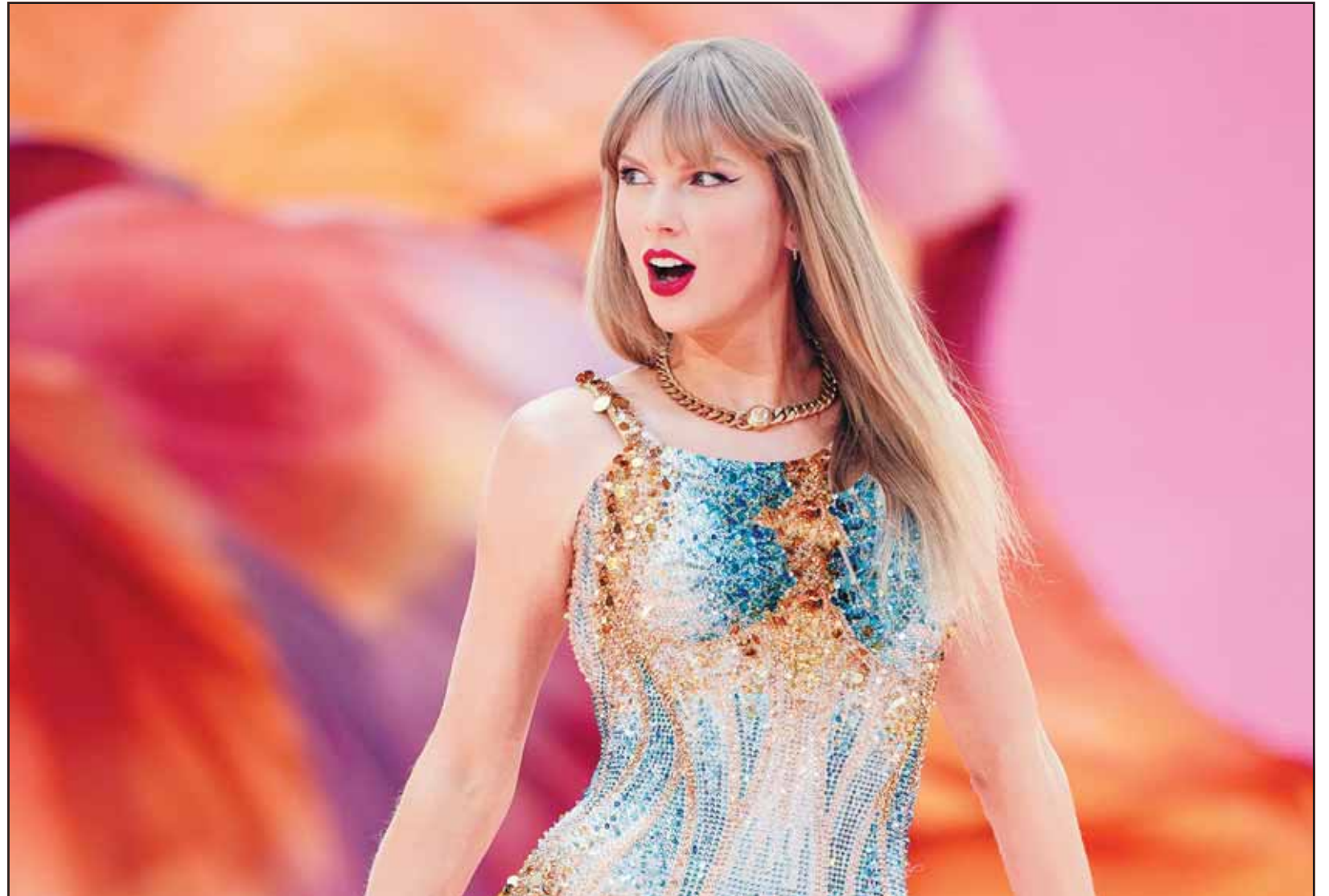
Taylor Swift performs at Wembley Stadium as part of her Eras Tour June 21, 2024 in London.

The novel has the sap and safe predictability of a Hallmark movie, but with the bonus ability to make you laugh out loud and cry real tears and become way more invested in the characters than any silly romance ought to make you do.