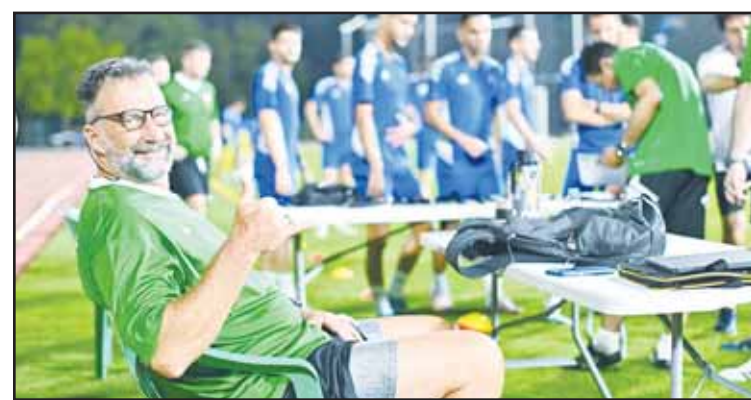
Pizzi led the first training session with Kuwait.

Ticket sales for the Jordan vs. Kuwait match began. Ticket prices are set at 20 dinars for the special class, 6 dinars for the second class, and 4 dinars for the third class.