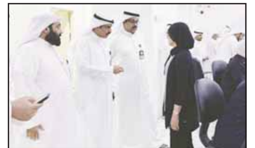
Director General of the Public Authority for the Disabled, Al-Humaidi Al-Mutairi, while inspecting the progress of work.

He also inspected the customer lounges and studied the work mechanism, confirming that the lounges are now operating at full capacity following a temporary shutdown of the automated system for several days due to a power outage.