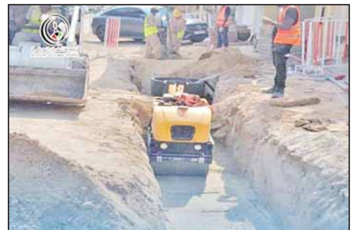
Maintenance work ongoing in Qurtoba.

Moreover, the high traffic volume on Kabad Road has led to frequent accidents, further compounding the