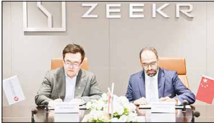
ZEEKR and Al Babtain Group sign exclusive deal for electric vehicle distribution.

The Kuwaiti index fell by more than half a percentage point, as noted earlier. Oil prices had rebounded last Friday, gaining $2 to reach $79 per barrel of Brent crude.