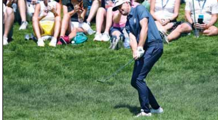
Keegan Bradley hits the rough on the seventh hole during the final round of the BMW Championship golf event at Castle Pines Golf Club in Castle Rock, Colo.

Frederic LaCroix of France played bogey-free for a 6-under 65 that allowed him to track down the mistake-prone leaders and win the Danish