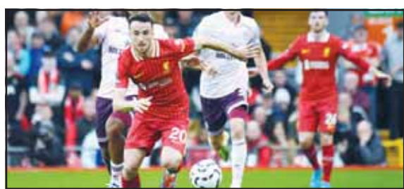
Liverpool's Diogo Jota, centre, in action during the English Premier League soccer match between Liverpool and Brentford at Anfield Stadium, Liverpool, England. Liverpool won 2-0.