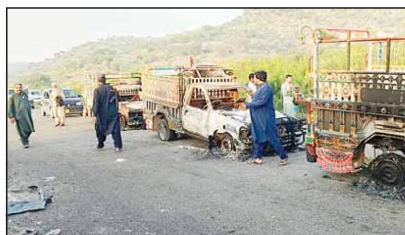
People look at burnt vehicles, torched by gunmen after killing passengers, at a highway in Musakhail, a district in Baluchistan province in southwestern Pakistan on Aug 26. Gunmen in southwestern Pakistan killed at least 38 people in two separate attacks on Monday and security forces killed 12 insurgents, officials said, in one of the deadliest days of violence in the restive Baluchistan province, with reports of other shootings and destruction in the area. (Xinhua)

"The leak is believed to be caused by the ship hitting an underwater object," it said, adding that salvage operations were underway. An investigation has been launched into the cause of the incident, it said.