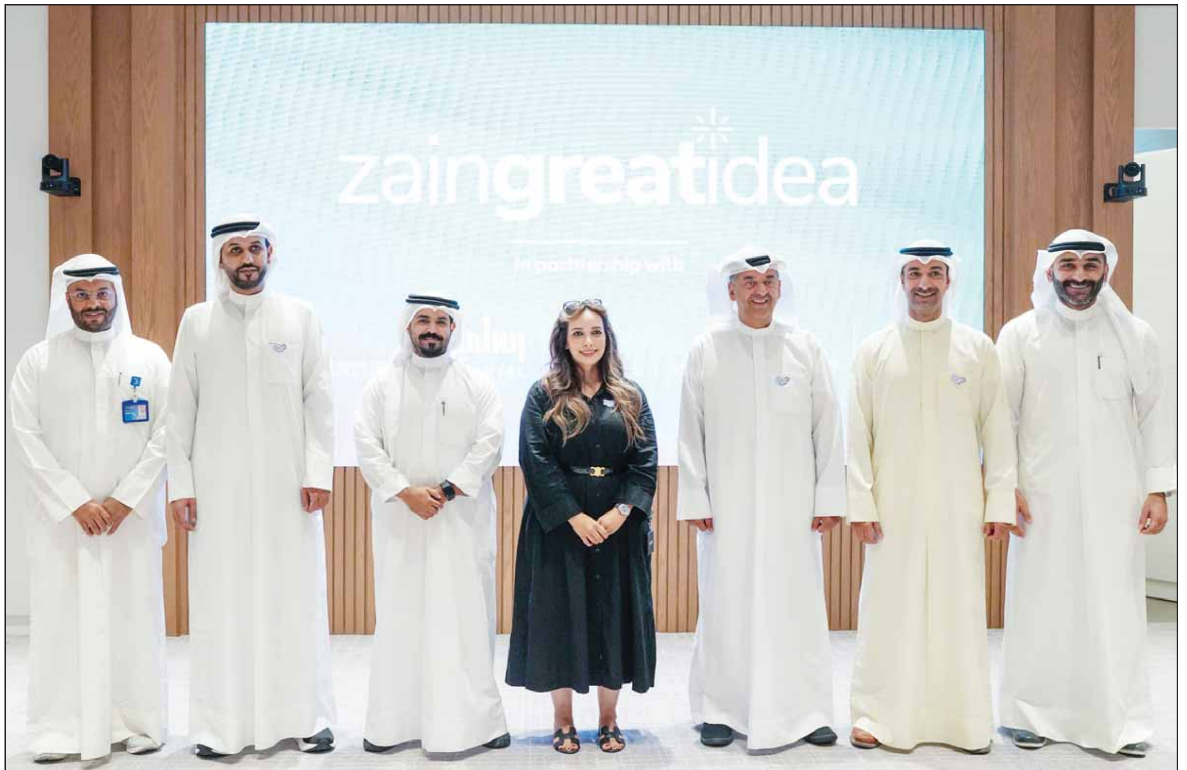
Zain, Zain Ventures, and Rasameel officials with ZGI alumni and entrepreneurs.