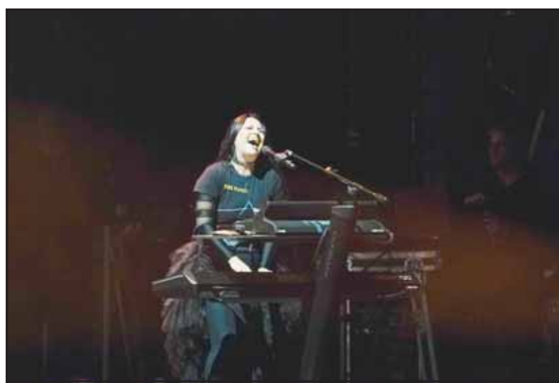
Amy Lee, lead singer of American rock band Evanescence, performs during the HERA HSBC music festival in Mexico City, Saturday, Aug. 24.

Sunday, 71 percent of young respondents in Taiwan choose travel destinations based on locations featured in their favorite films and TV shows, eager to "check in" at these iconic spots and experience the same restaurants or hotels seen