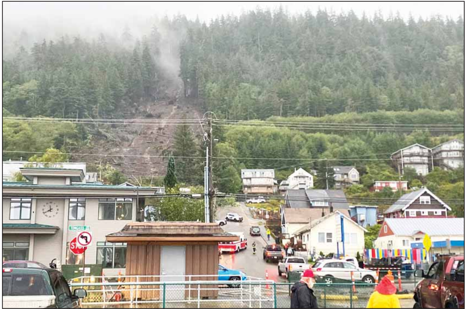
The aftermath of a deadly landslide is seen in Ketchikan, Alaska on Aug 25. (AP)

Local news site Visir said the group that was at the cave during the collapse was on an organized tour accompanied by a guide. (AP)