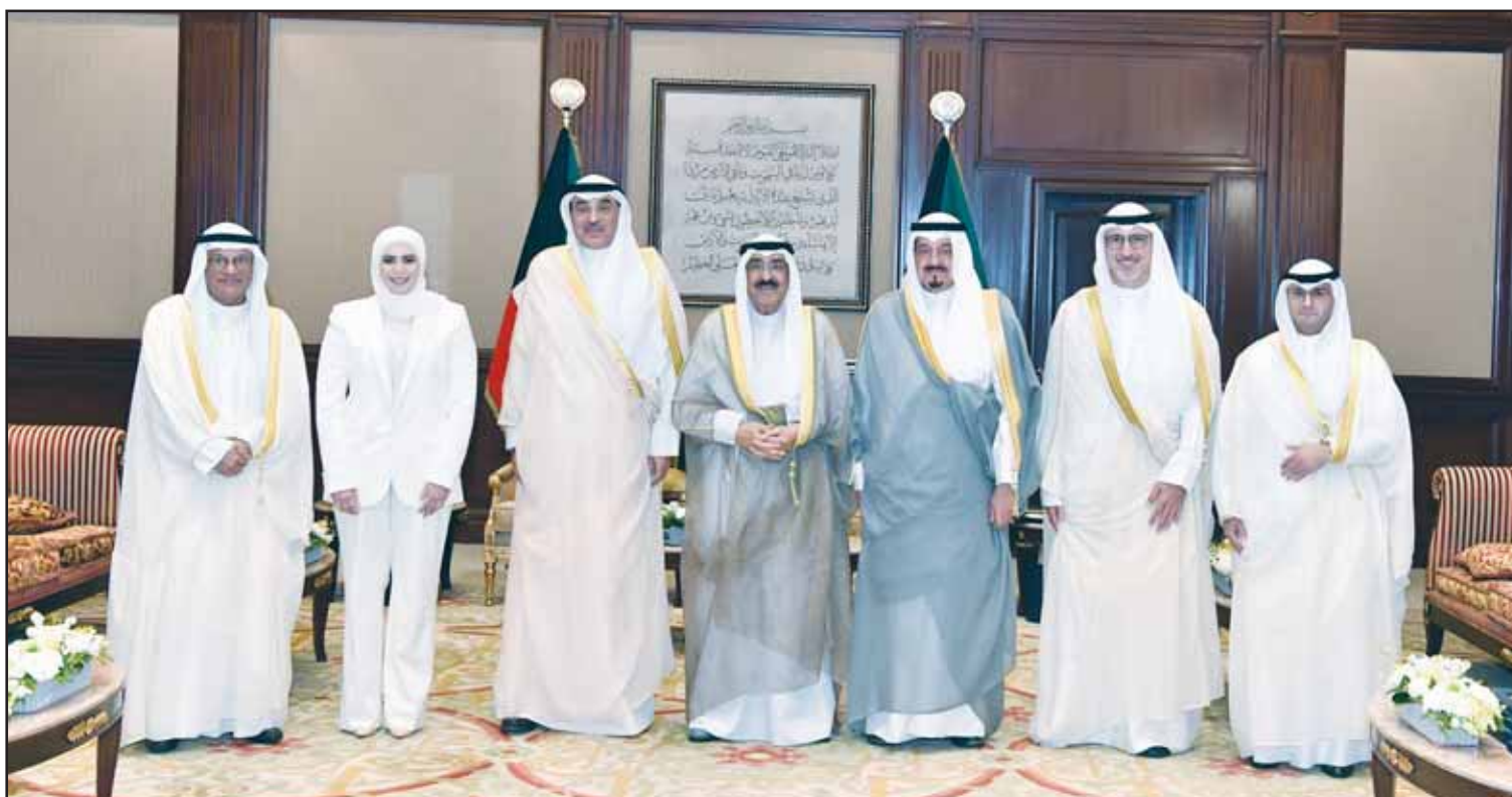
His Highness the Amir Sheikh Mishal Al-Ahmad Al-Jaber Al-Sabah poses for a picture with the new ministers after the oath-taking ceremony.