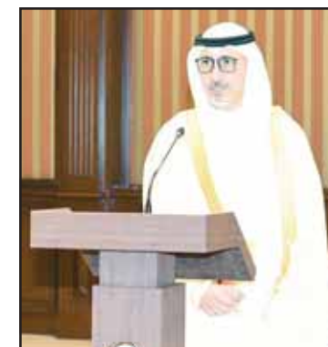
Khalifa Abdullah Ajeel Al-Askar Minister of Commerce and Industry