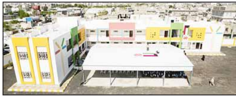
KUWAIT CITY, Aug 26: According to the current regulations, remote area allowance for employees is calculated from the actual date of their commencement of work at a government agency, and not from the date of their appointment. This only applies to employees who reside outside the approved areas for the allowance, reports Al-Anba daily quoting informed sources.

They explained that this is more apparent when applied to employees in government schools, who often begin their actual work on a date different from their appointment date. The value of the remote area allowance can vary based on the actual start date of employment.