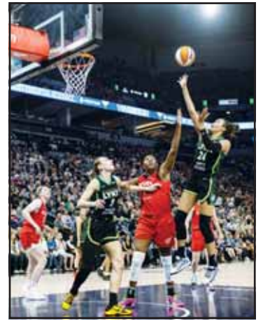
Minnesota Lynx forward Napheesa Collier (24) shoots the ball in the first half of a WNBA basketball game against the Indiana Fever at Target Center in Minneapolis.

Teaira McCowan knotted the score with a layup and gave Dallas the lead with a rebound basket with :07 to go. Stephanie Talbot made just 1 of 2 free throws for the Sparks, while Howard sank a pair for a three-point lead. Dear-