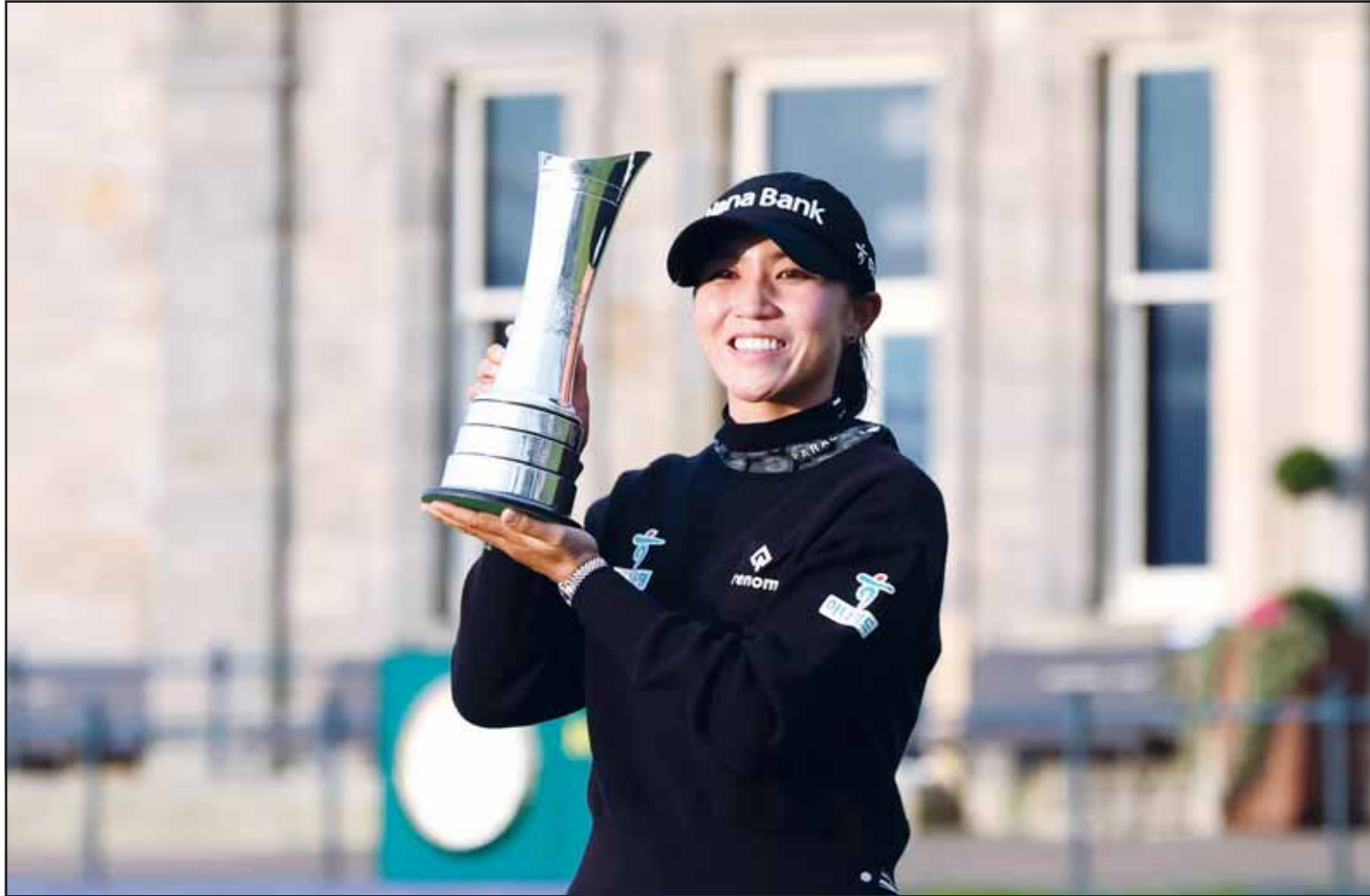
Lydia Ko of New Zealand, poses for the media with the trophy for winning the Women's British Open golf championship, and becoming Champion golfer, in St. Andrews, Scotland.