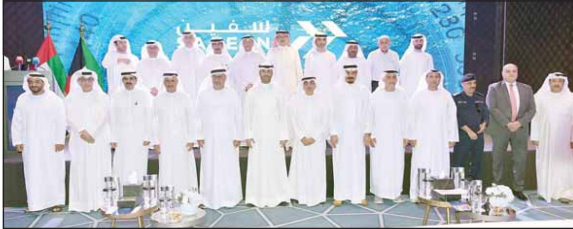
Group photo during the ceremony.