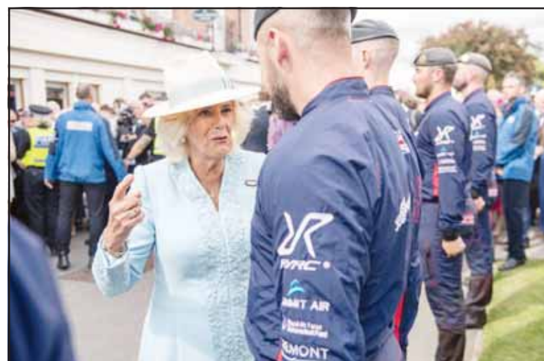
Britain's Queen Camilla speaks during a visit to open the Bustardthorpe Development at York Racecourse, North Yorkshire, England on Aug 24.

NY police probe deaths of 5: Police on Sunday were investigating the deaths of five