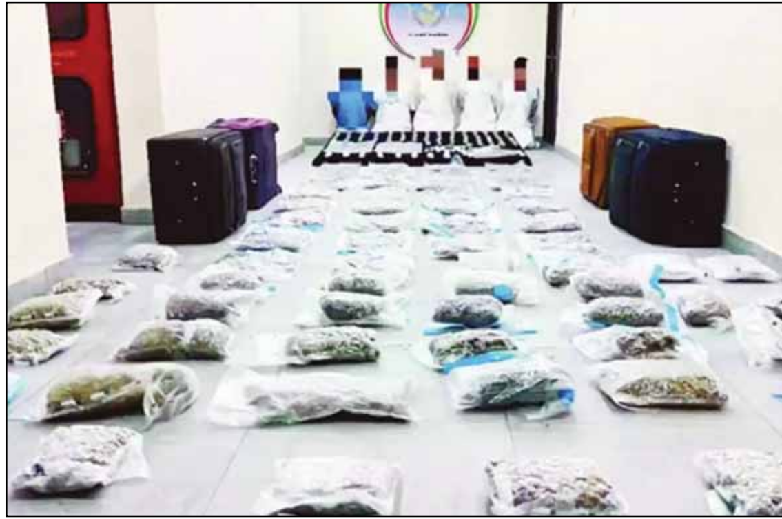
The five accused with the seized contraband.

— Compiled by PFX Fernandes and Mahmoud Ateyeh