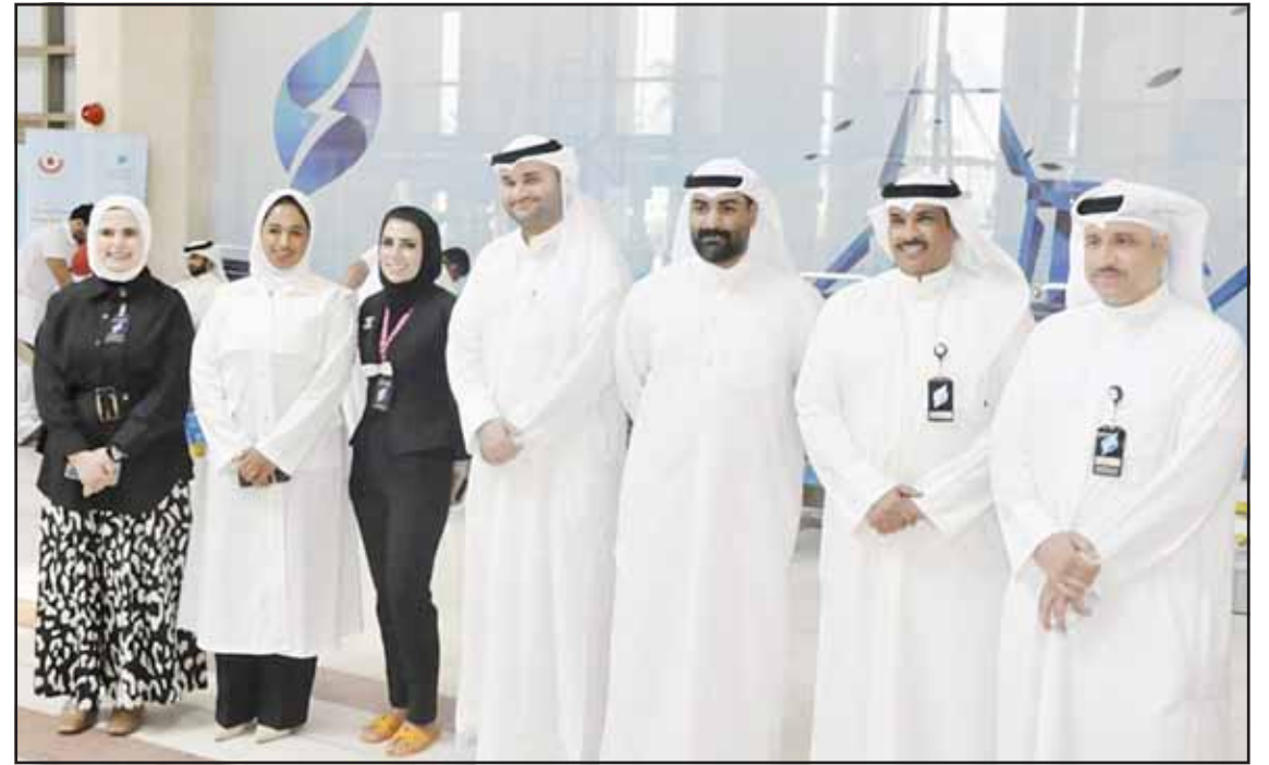
Group photo during the blood donation campaign organized by the Ministry of Electricity, Water and Renewable Energy.

He stated that the school will provide great opportunities for young girls whether refugees or hosting community, to escape woes of illiteracy.