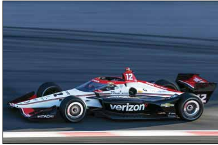
Will Power drives during an IndyCar auto race at World Wide Technology Raceway in Madison, Ill.

fun," Ferrucci said. "To get the pole for us was a huge deal. It's huge to qualify on pole, we've just been so consistent."