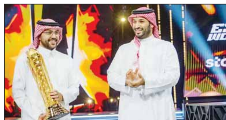
Saudi Crown Prince and Prime Minister, Prince Mohammed bin Salman awards Esports World Cup to the Falcons.

RIYADH, Aug 26: Saudi Crown Prince and Prime Minister, Prince Mohammed bin Salman, awarded the World Cup of Electronic Sports to the Saudi Falcons team at the closing ceremony of the tournament's inaugural edition. The event took place in Riyadh, with nearly 500 teams and 1,500 professional players from around the globe competing over eight weeks for the largest prize pool in the history of electronic sports, totaling $7 million from an