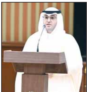
Abdullatif Hamed Al-Meshari Minister of State for Municipal Affairs and Minister of State for Housing Affairs