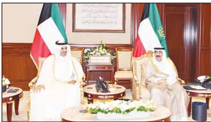
Left: His Highness the Amir Sheikh Mishal Al-Ahmad Al-Jaber Al-Sabah receives the Qatari Minister of State for Energy Affairs and Managing Director and CEO of QatarEnergy, Engineer Saad bin Sherida Al-Kaabi. Right: His Highness the Prime Minister Sheikh Ahmad Abdullah Al-Ahmad Al-Sabah meets the visiting Qatari Minister of State for Energy Affairs.