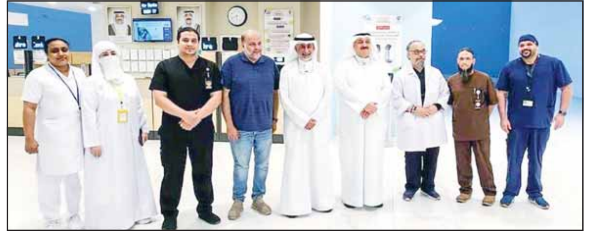
Part of the inspection tour of Al-Jahra Specialized Dental Center.