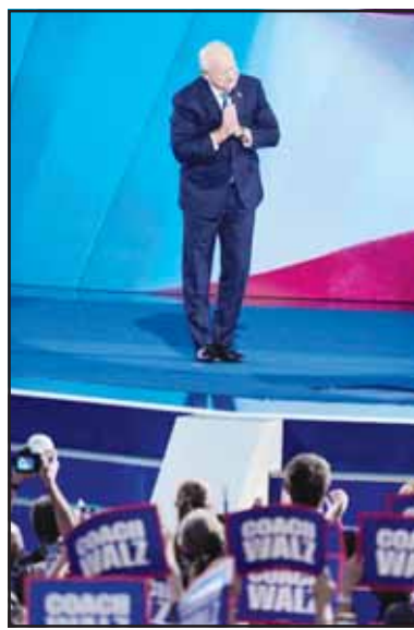
US Democratic vice presidential nominee Minnesota Gov. Tim Walz speaks on stage to speak during the Democratic National Convention on Aug 21 in Chicago.

But Harris is putting her own spin on what has been a central messaging strategy for Democrats. Rather than focusing on the existential threat a second Trump term could pose to the country's foundational institutions and traditions, she is expanding Democrats' definition of what's at stake in this election: It's about preserving personal freedoms.