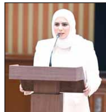
Nora Suleiman Al-Fassam Minister of Finance and Minister of State for Economic and Investment Affairs

Furthermore, the ministry has hinted on the possibility of cutting off power in certain parts of some non-residential areas due to the emergency repair of some power generation units.