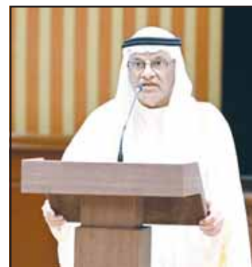
Dr. Nader Abdullah Al-Jallal Minister of Higher Education and Scientific Research and Acting Minister of Education

the University of South California and a Master's degree in Architecture from Harvard University