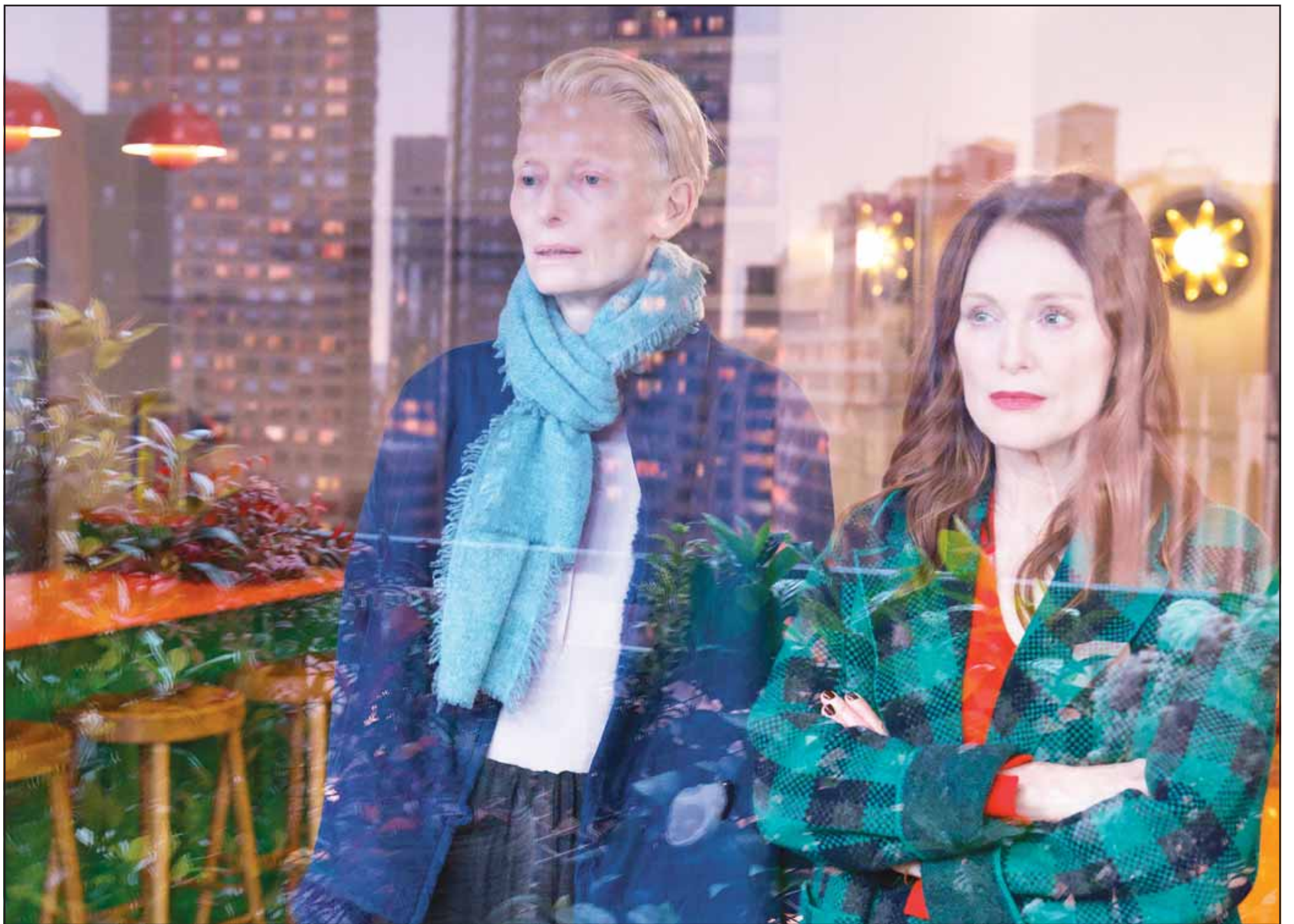
This image released by Sony Pictures Classics shows Julianne Moore, (right), and Tilda Swinton in a scene from ‘The Room Next Door.’