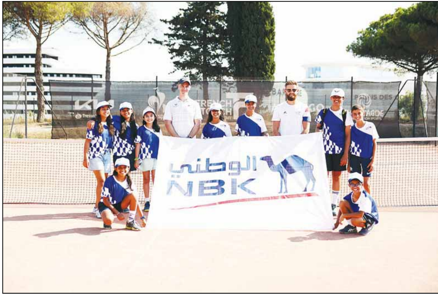
Group photo from the summer camp.

"At NBK, we believe in the transformative power of sports, especially for our youth. Partnering with the Rafa Nadal Tennis Academy in Kuwait is not just about tennis; it's about shaping character, fostering teamwork, and instilling lifelong values. Through this sponsorship, we aspire to build a legacy