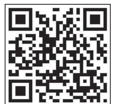
Scan here to register in ZGI

consulting, online business strategy, product development, digital marketing, user experience consulting, and more throughout the program's phases. Architech Solutions' will help provide solutions for designing, developing, and delivering cutting-edge software and mobile applications.