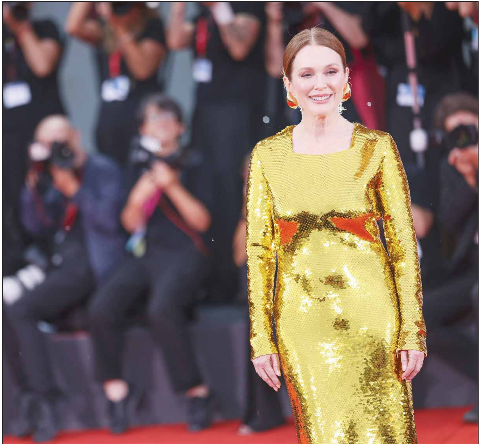
Julianne Moore poses for photographers upon arrival for the premiere of the film 'The Room Next Door' during the 81st edition of the Venice Film Festival in Venice, Italy, on Monday, Sept. 2.

Eugene Levy isn't just a co-host this year - he also nominated for his Apple TV+ series "The Reluctant Traveler With Eugene Levy," the unlikely wedding of a droll and cautious host with some of the most beautiful places on Earth.