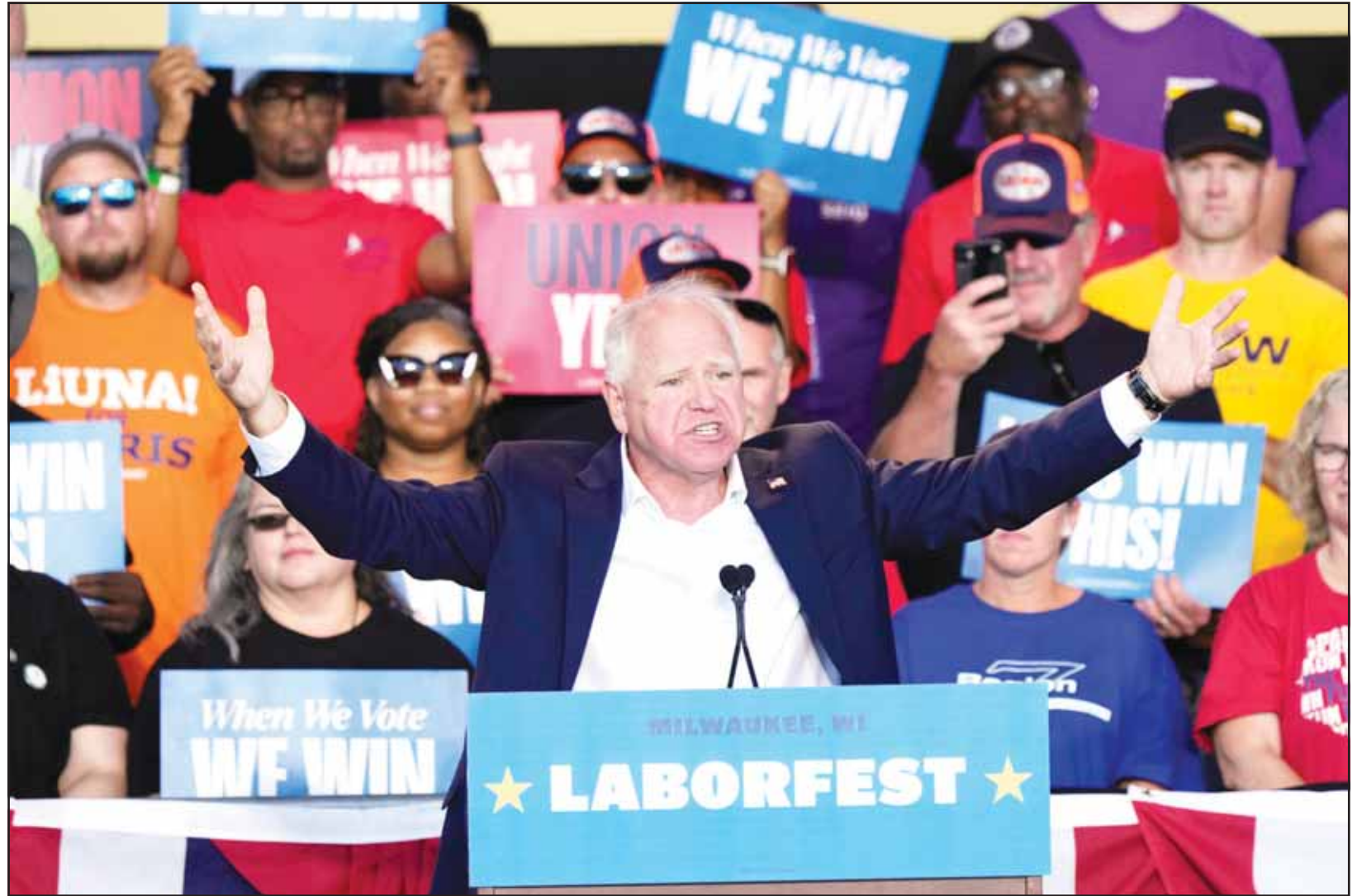
US Democratic vice presidential nominee Minnesota Gov Tim Walz speaks during a campaign stop at Laborfest on Sept 2, in Milwaukee.

"Unfortunately, the bottom of the boat ripped open," said Olivier Barbarin, mayor of Le Portel near the fishing port of Boulogne-sur-Mer, where a first-aid post was set up to treat victims. "It's a big drama.