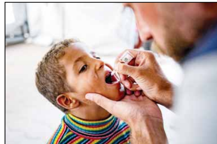
A health worker administers a polio vaccine to a child at a hospital in Deir al-Balah, central Gaza Strip, Sunday, Sept. 1, 2024.

The Primary and Secondary Healthcare Department of Punjab released the