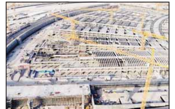
Shaddadiyah Industrial Zone project.

On the other hand, legislative challenges were the least significant, constituting about 5 percent of the total challenges facing the development plan's projects.