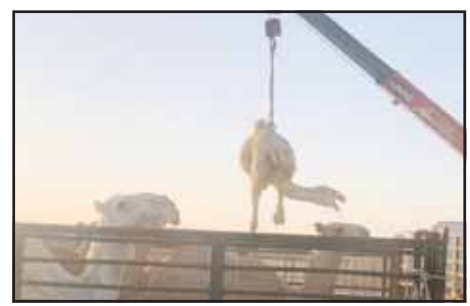
One of the seized camels being lowered into a vehicle.

This directive comes at the request of the Ministry of Education. Warning stickers have been placed on the canopies, and as of today, 67 awnings have already been removed voluntarily.