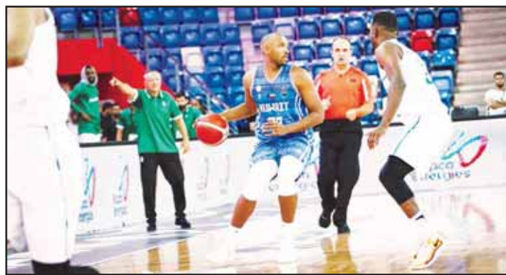
Kuwaiti player dribbles the ball as Saudi defends during the opening match.

dismissed Pakistan for 172 in the second innings to leave Bangladesh a victory target of 184 in four sessions.