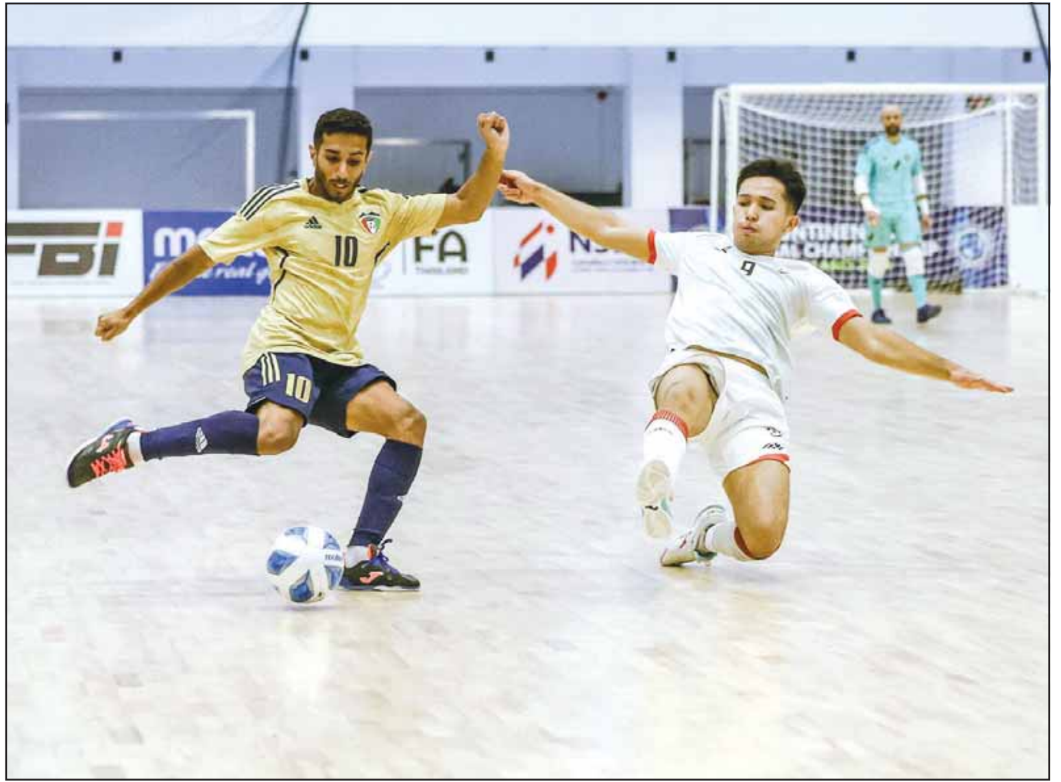
Players fight for the ball during Kuwait-Afghanistan match in Thailand.