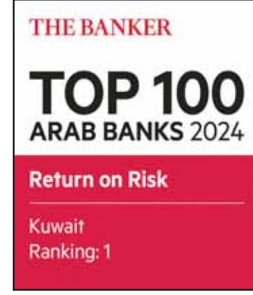
First in Return on Risk

Founded in 1926, The Banker is the world's premier banking and finance resource, providing comprehensive economic and financial information. The Banker holds a highly esteemed position and is considered one of the most trustworthy publications in the banking industry in the region. It upholds the highest standards of journalistic excellence in the field of finance, precise reporting, thorough analysis, professionalism, and integrity.