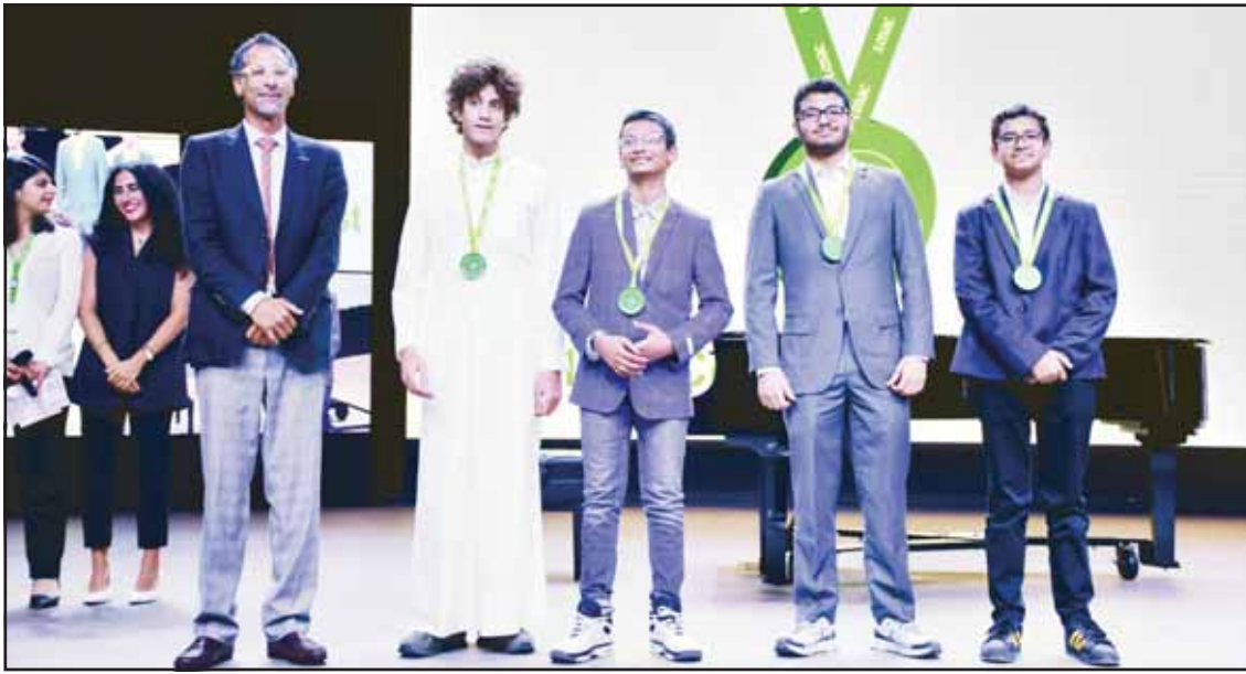
Agility awards one of the winning teams.