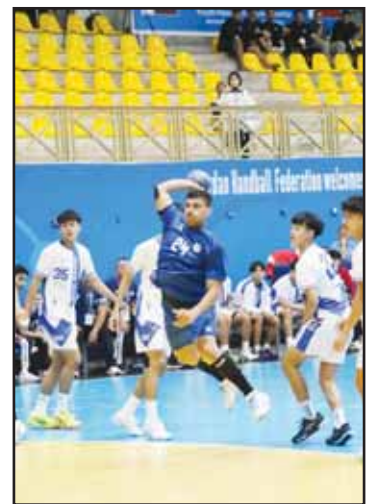
A Kuwaiti player makes a goal attempt against Chinese Taipei.