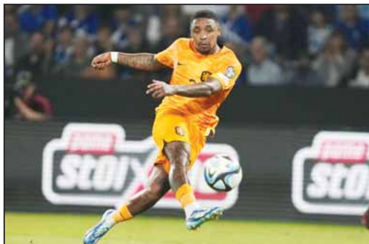
In this file photo, Netherlands' Steven Bergwijn makes an attempt to score during the Euro 2024 Group B qualifying soccer match between Greece and The Netherlands at the OPAP Arena in Athens, Greece.

Suárez will continue at Inter Miami, which he has previously said will be his last club. He's also had a stellar career at clubs including Barcelona, Liverpool, Ajax and Atletico Madrid.