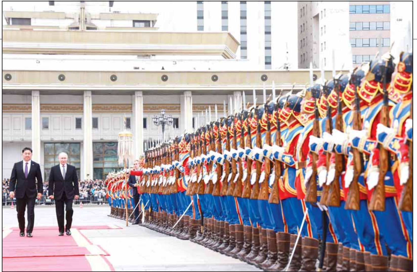
Russian President Vladimir Putin and Mongolian President Ukhnaagiin Khurelsukh, (left), attend a welcome ceremony in Sukhbaatar Square in Ulaanbaatar, Mongolia, on Sept 3.