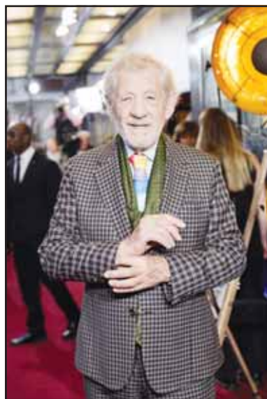
Ian McKellen, poses for photographers upon arrival at the European Premiere of the The Critic, in London, Monday, Sept. 2.

McKellen: They began very well when I was at Cambridge University in a play. It was "Henry IV, Part 2," which is part of the play that I've been doing when I played Falstaff.