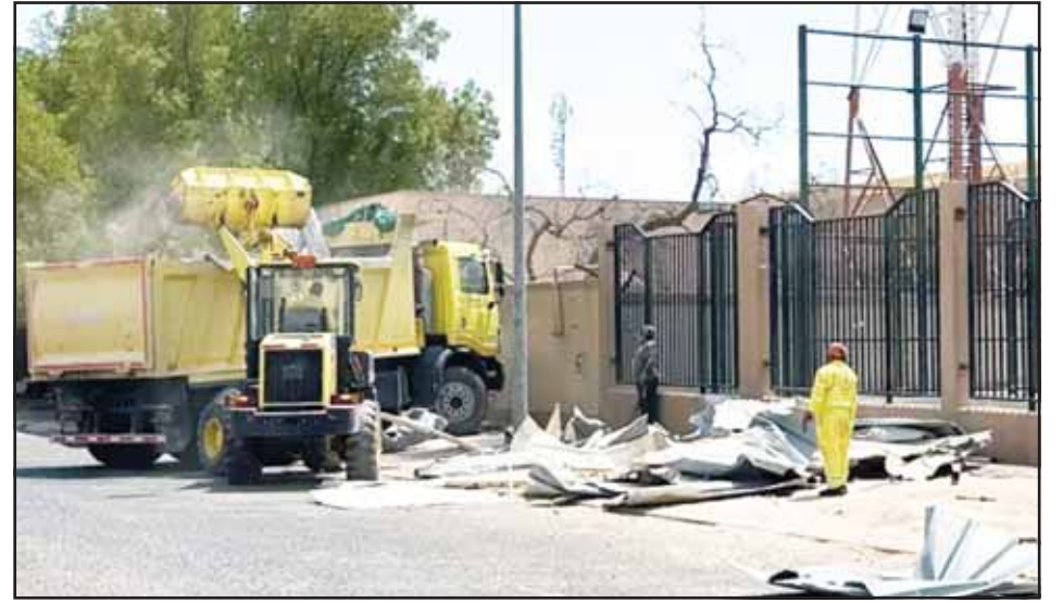
One of the awnings being voluntarily dismantled.

According to security sources, a Kuwaiti citi-