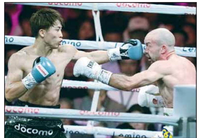
Japanese champion Naoya Inoue, left, and Irish challenger TJ Doheny, right, during the first round of a boxing match for the unified WBA, WBC, IBF and WBO super bantamweight world titles in Tokyo.

The fight was over 16 seconds into the seventh when Doheny wriggled free from a flurry of punches before saying he couldn't continue. The Irishman left the ring in clear pain and without conducting an interview.