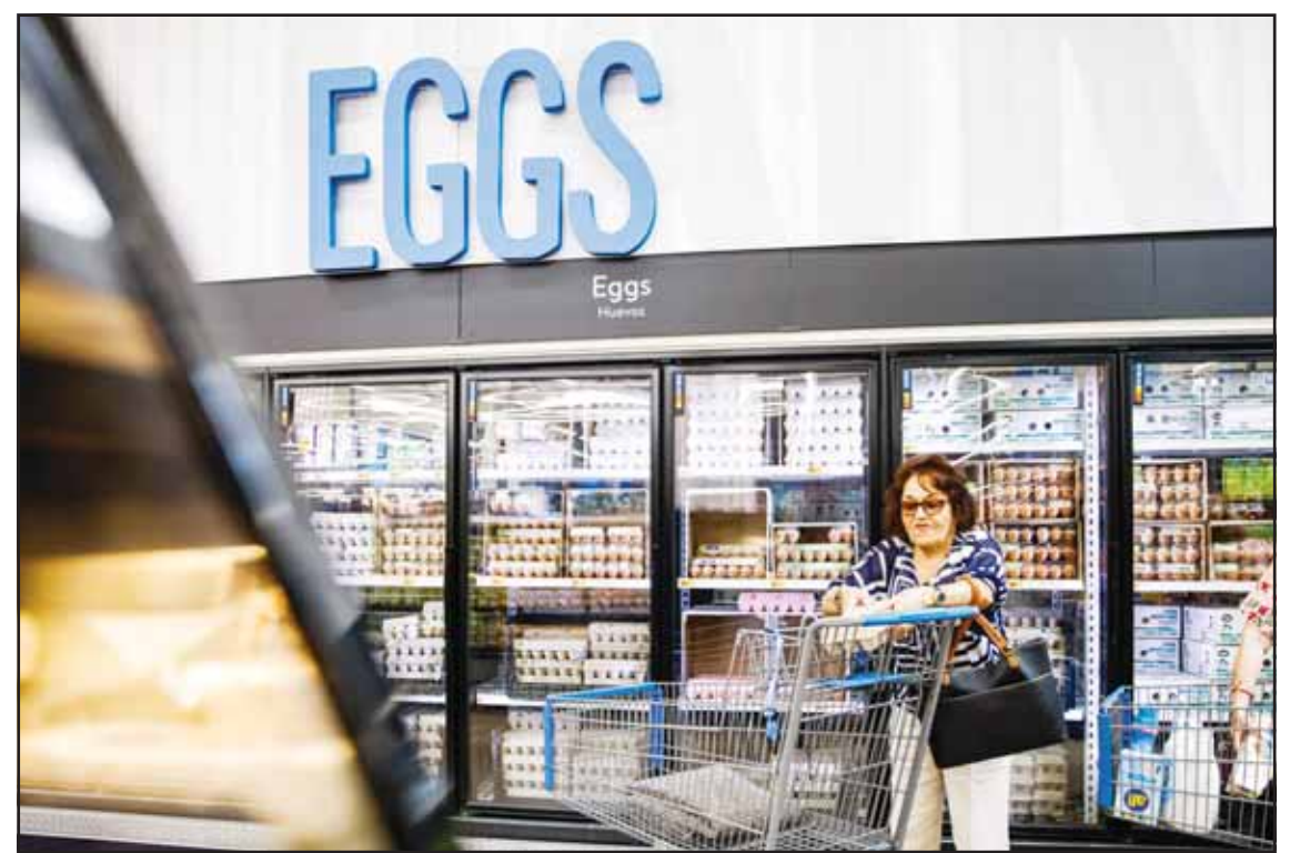
A woman buys eggs at a Walmart Superstore in Secaucus, New Jersey, July 11, 2024.