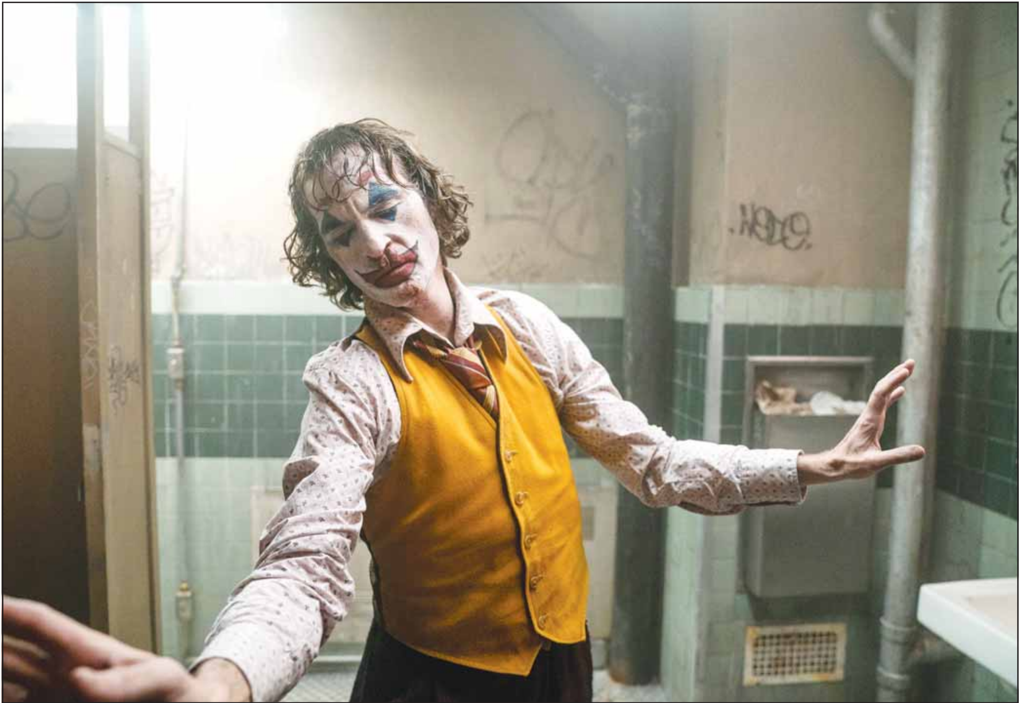
This image released by Warner Bros. Pictures shows Joaquin Phoenix in a scene from 'Joker.' (AP)