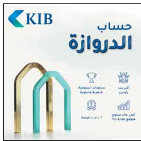
KIB's Al Dirwaza account.

Al Dirwaza account holders are eligible to enter the weekly, monthly and annual draws on the condi-