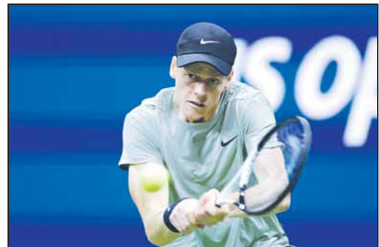
Jannik Sinner, of Italy, returns a shot to Tommy Paul, of the United States, during a fourth round match of the U.S. Open tennis championships in New York.

Swiatek was tied at 4-all with No. 16 Liudmila Samsonova on Monday night before grabbing seven straight games en route to winning 6-4, 6-1. When Swiatek captured the 2022