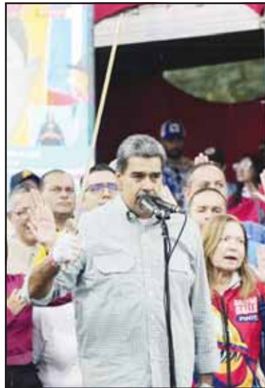
Venezuela's President Nicolás Maduro brandishes a sword as his new Cabinet takes the oath of office, at the presidential palace in Caracas, Venezuela on Aug 28.