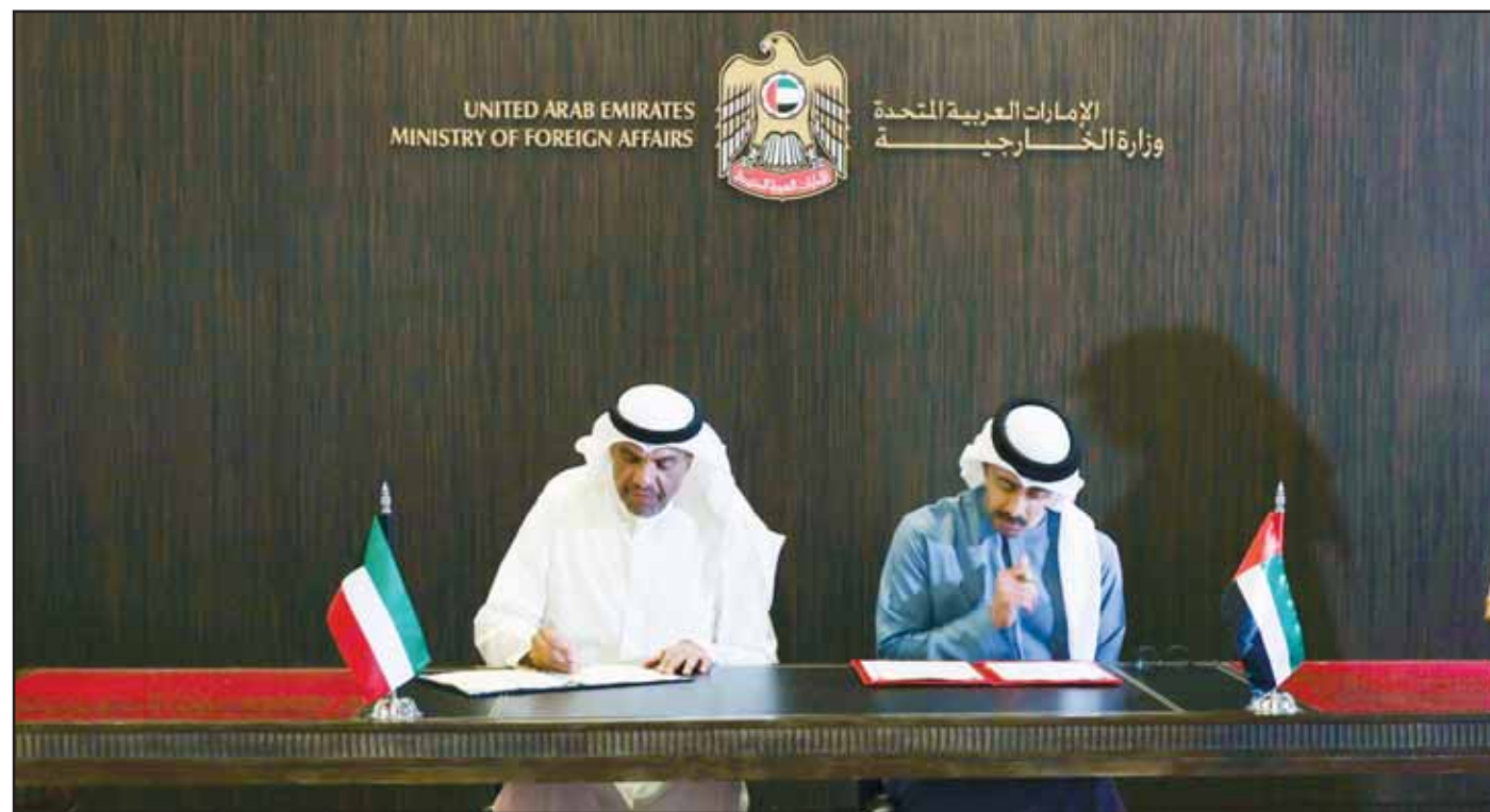
Kuwait's Foreign Minister Abdullah Al-Yahya (left) and Deputy Prime Minister and Minister of Foreign Affairs Sheikh Abdullah bin Zayed during the signing of MoUs with the UAE.

Cybersecurity among many MoUs signed by Kuwait, UAE