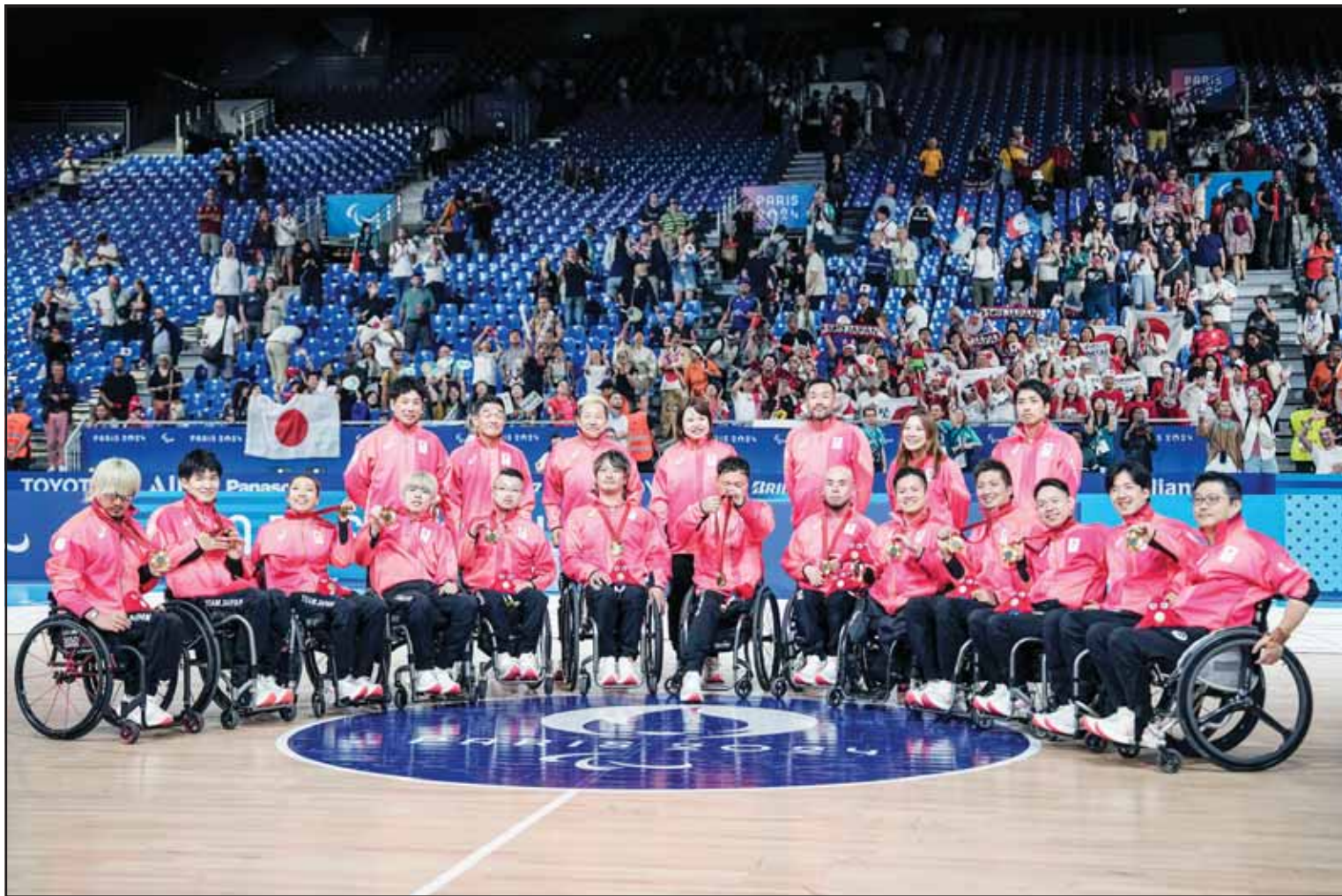
Japan players celebrate with the gold medal after the medal ceremony during the wheelchair rugby gold medal match between Japan and the U.S. at the 2024 Paralympics in Paris, France.