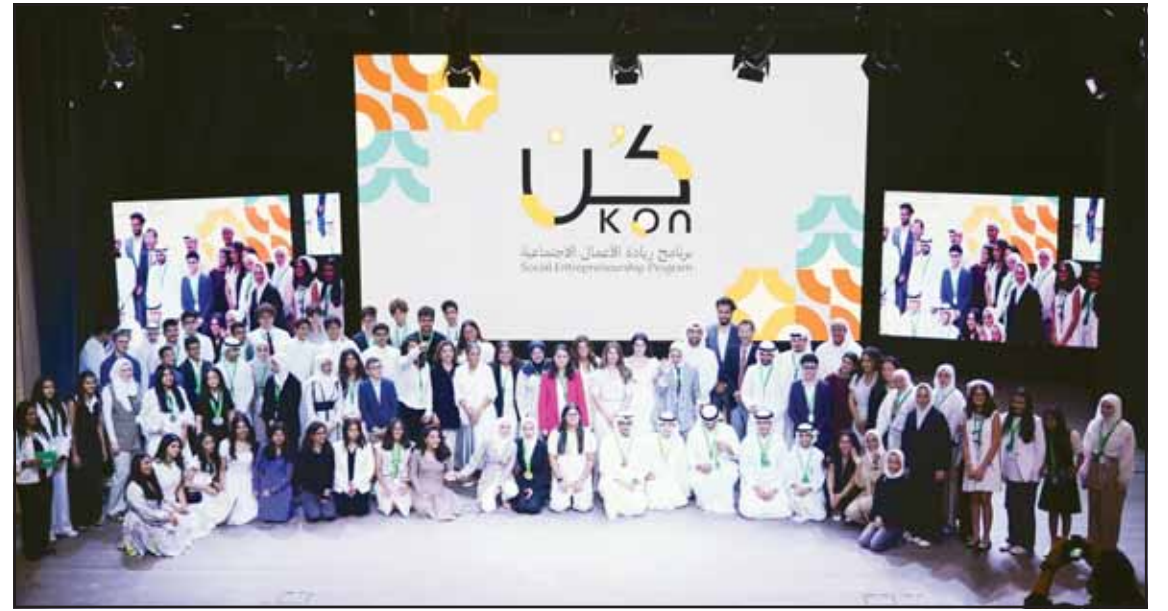
Group photo of KON participants.