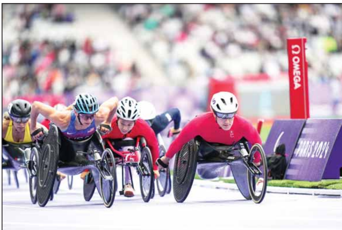
Switzerland's Catherine Debrunner, right, and Susannah Scaroni of the U.S., foreground left, compete for the lead of the women's 1500 m. T54 during the 2024 Paralympics in Paris, France.