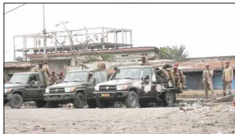
This image made from video shows state security forces outside Makala prison in Kinshasa, Democratic Republic of the Congo, following an attempted jailbreak in Congo's main prison on Sept 2. An attempted jailbreak in Congo's main prison in the capital left at least 129 people dead, most of them in a stampede, authorities said Tuesday.