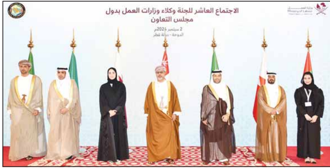
Participants pose for a group photo during the 10th meeting of the GCC Ministries of Social Affairs and Development Undersecretaries Committee, currently held in Doha.