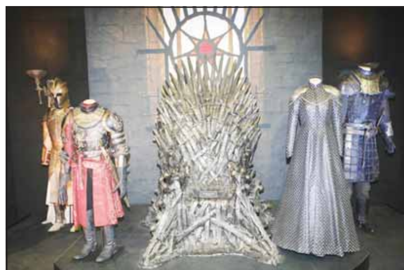
The Iron Throne and costumes on display during the launch of The Game of Thrones Touring Exhibition at the Titanic Exhibition centre in Belfast, Northern Ireland, Wednesday, April 10, 2019. (AP)

"She was an incomparable friend to hundreds of people who will miss her wit,