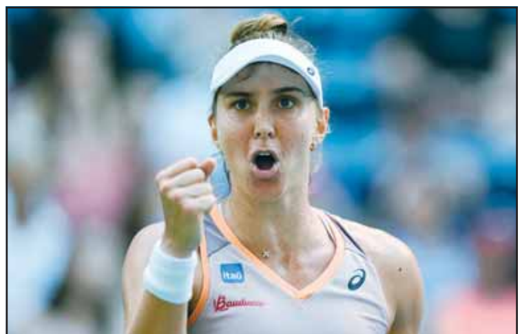
Beatriz Haddad Maia, of Brazil, reacts during a match against Caroline Wozniacki, of Denmark, in the fourth round of the U.S. Open tennis championships in New York.

as key preparation for its upcoming participation in the Asian Indoor Games, which will also take place in Thailand from November 21 to 30.