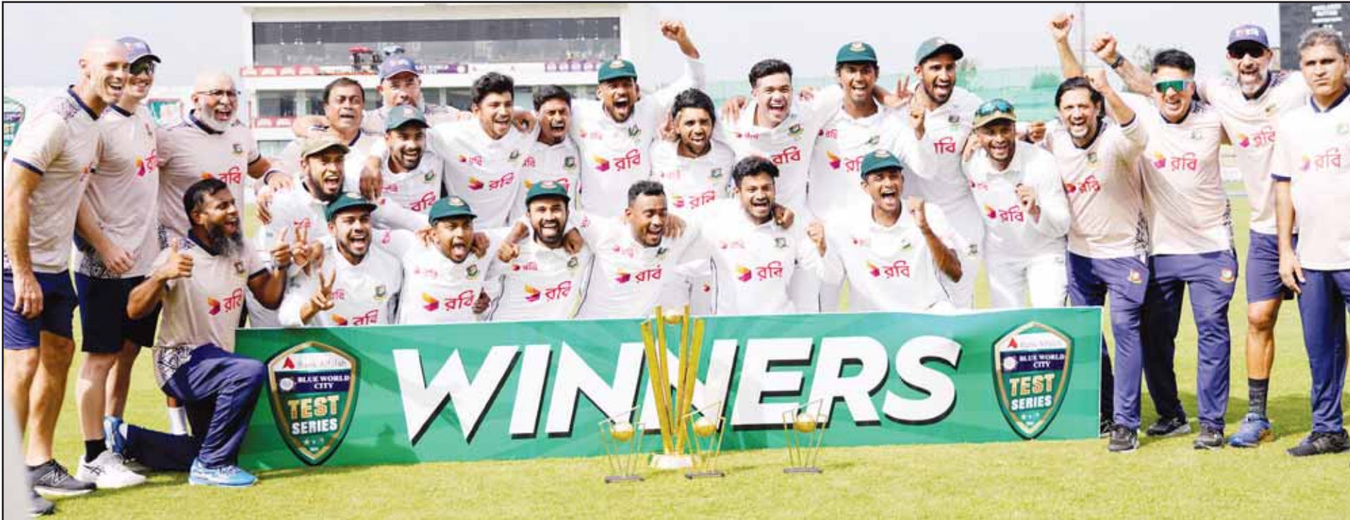
Bangladesh's officials and players pose for photograph after winning the test cricket series against Pakistan, in Rawalpindi, Pakistan.