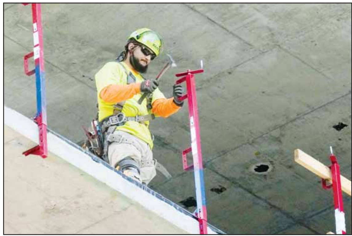
A construction worker installs a safety railing on a new building in Philadelphia, Tuesday, Sept. 3, 2024.