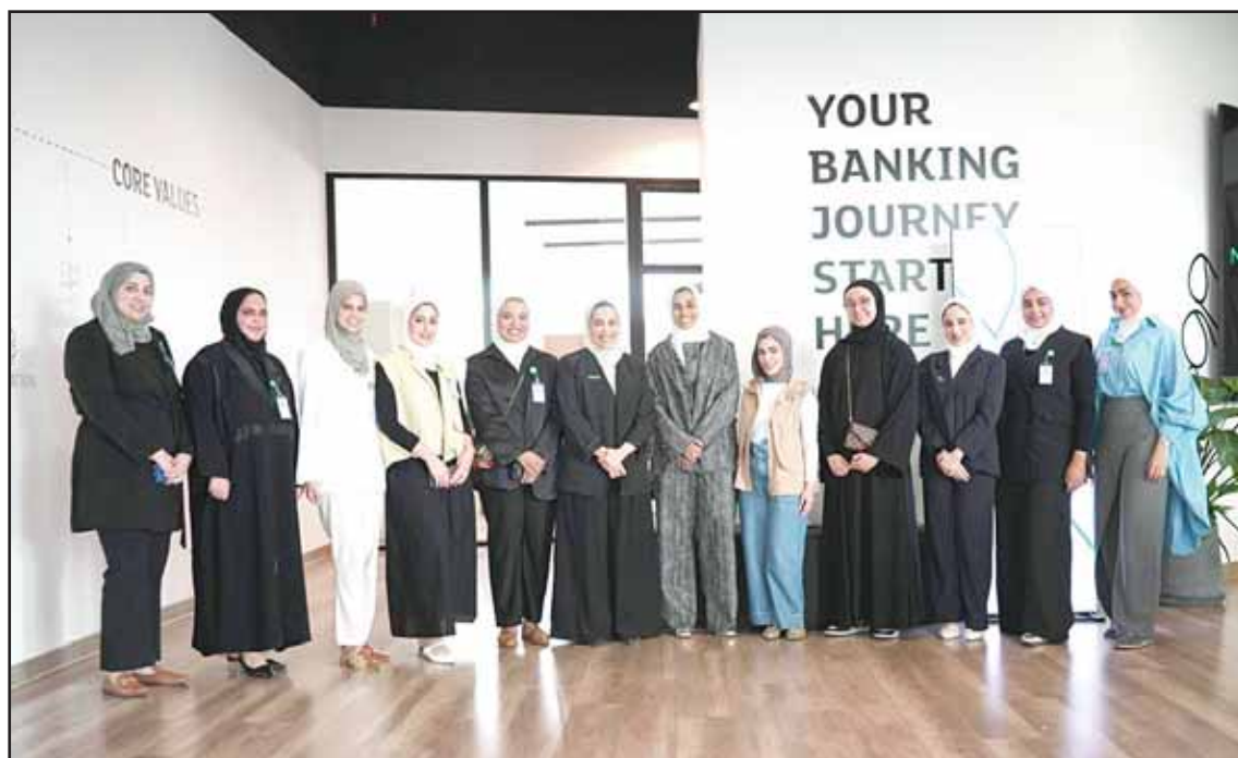
PR Academy trainees