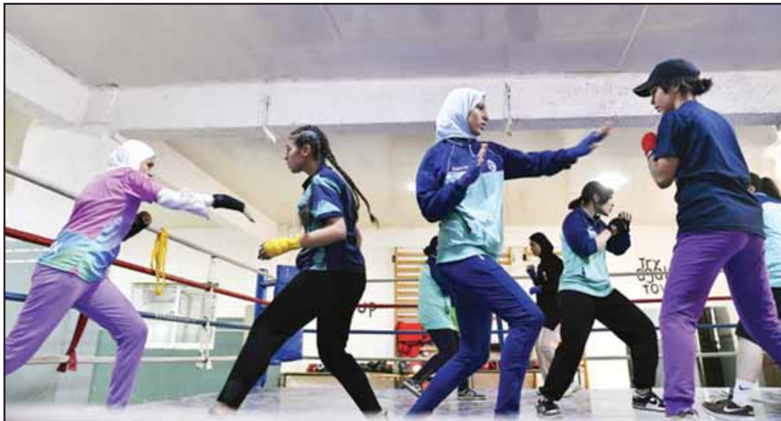
Girls train for boxing at Ahmed Qayed school, where Olympic boxer Imane Khelif trained as a child, in Tiaret, Algeria.