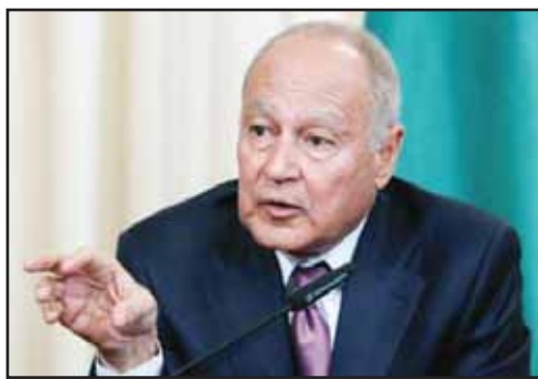
Ahmed Aboul Gheit