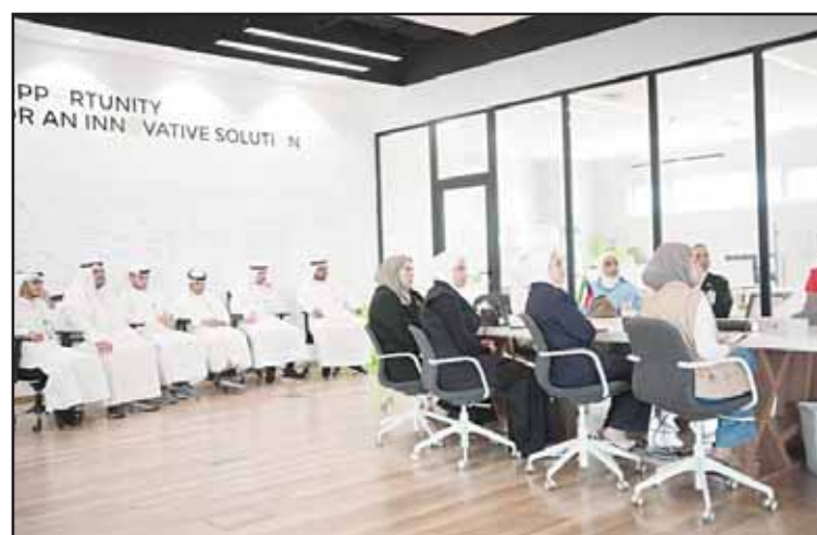
PR Academy team during the workshop.