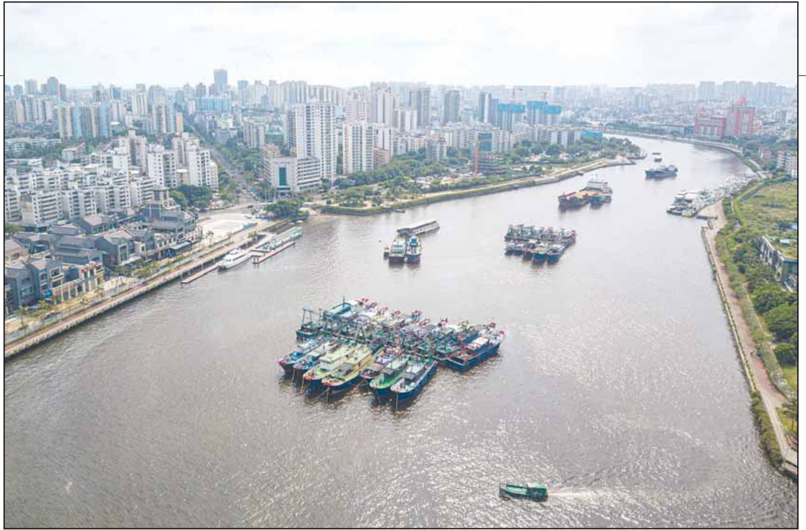
In this photo released by Xinhua News Agency, an aerial view shows boats docking near a harbor after the State Flood Control and Drought Relief Headquarters raised its emergency response for flood and typhoon prevention for Typhoon Yagi, in Haikou, south China's Hainan Province on Sept 4. (AP)

Her son left behind an 8-year-old daughter.