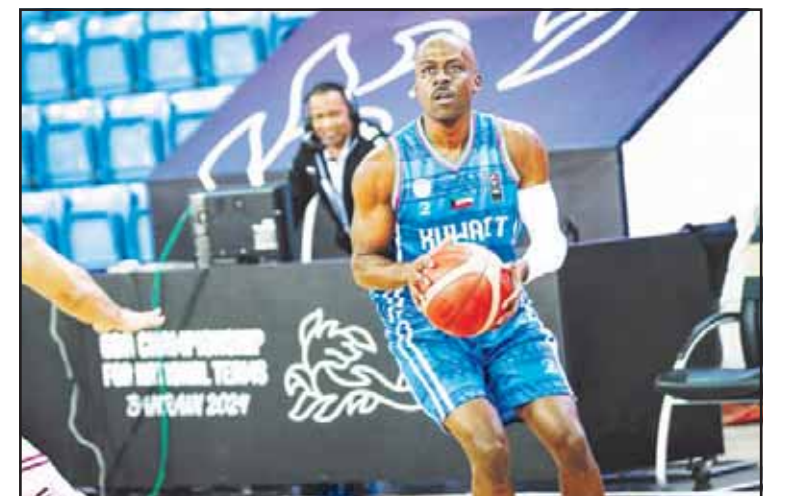
A Kuwaiti prepares to shoot.

Meanwhile, Kuwait's national youth team was eliminated from the Asian Cup finals in the first round, following a 51-62 loss to India in its final Group Two match.