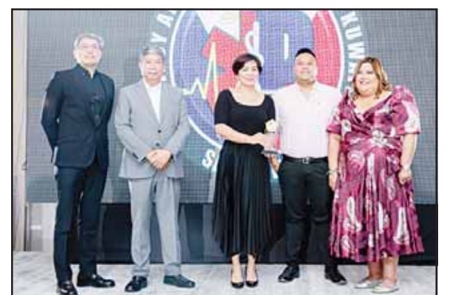
The Pinoy Ambulance Nurses in Kuwait (PANIK).

violinist Nancy Alsafadi. Some guests also had fun having their caricature drawn by multi-awarded Filipino artist Buboy Aguilar as a souvenir. The Thanksgiving Night is a prelude to the grand 10th anniversary celebration - the Pinoy Arabia Barrio Fiesta 2024 which is set on November 8, 2024 with the full details to be announced later. One of the event's highlights will be the DJ Quest 2024.