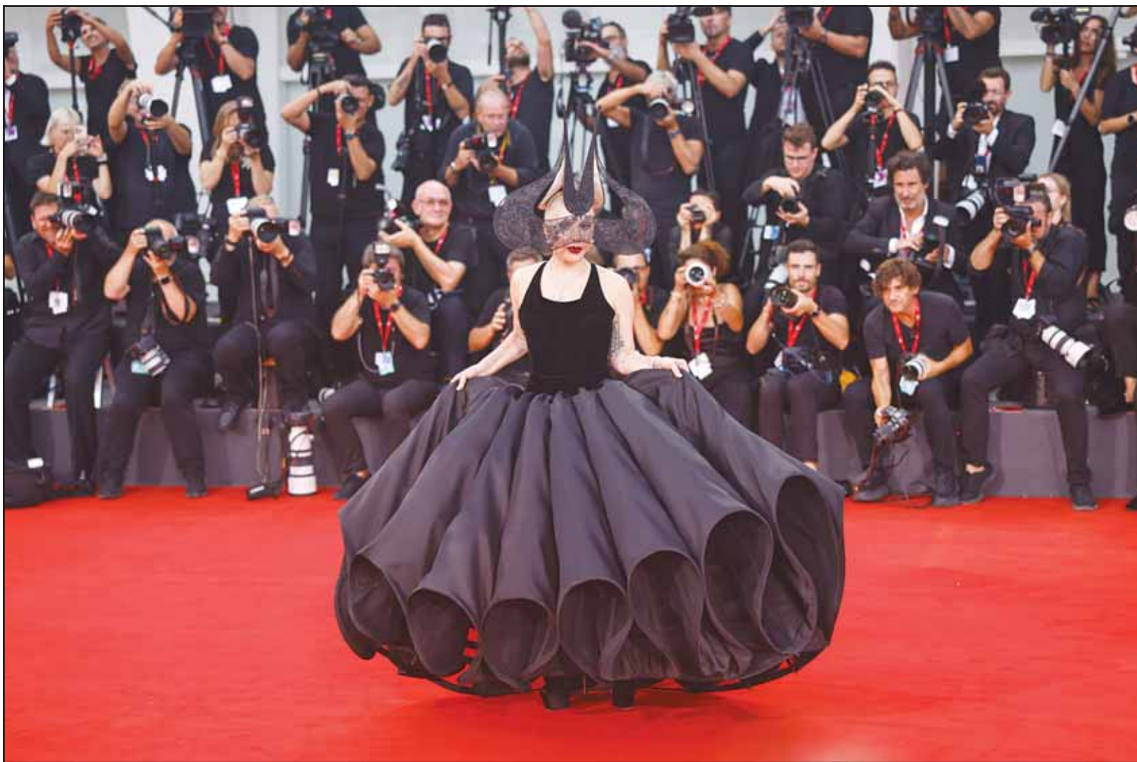
Lady Gaga poses for photographers upon arrival for the premiere of the film 'Joker: Folie A Deux' during the 81st edition of the Venice Film Festival in Venice, Italy, on Wednesday, Sept. 4.