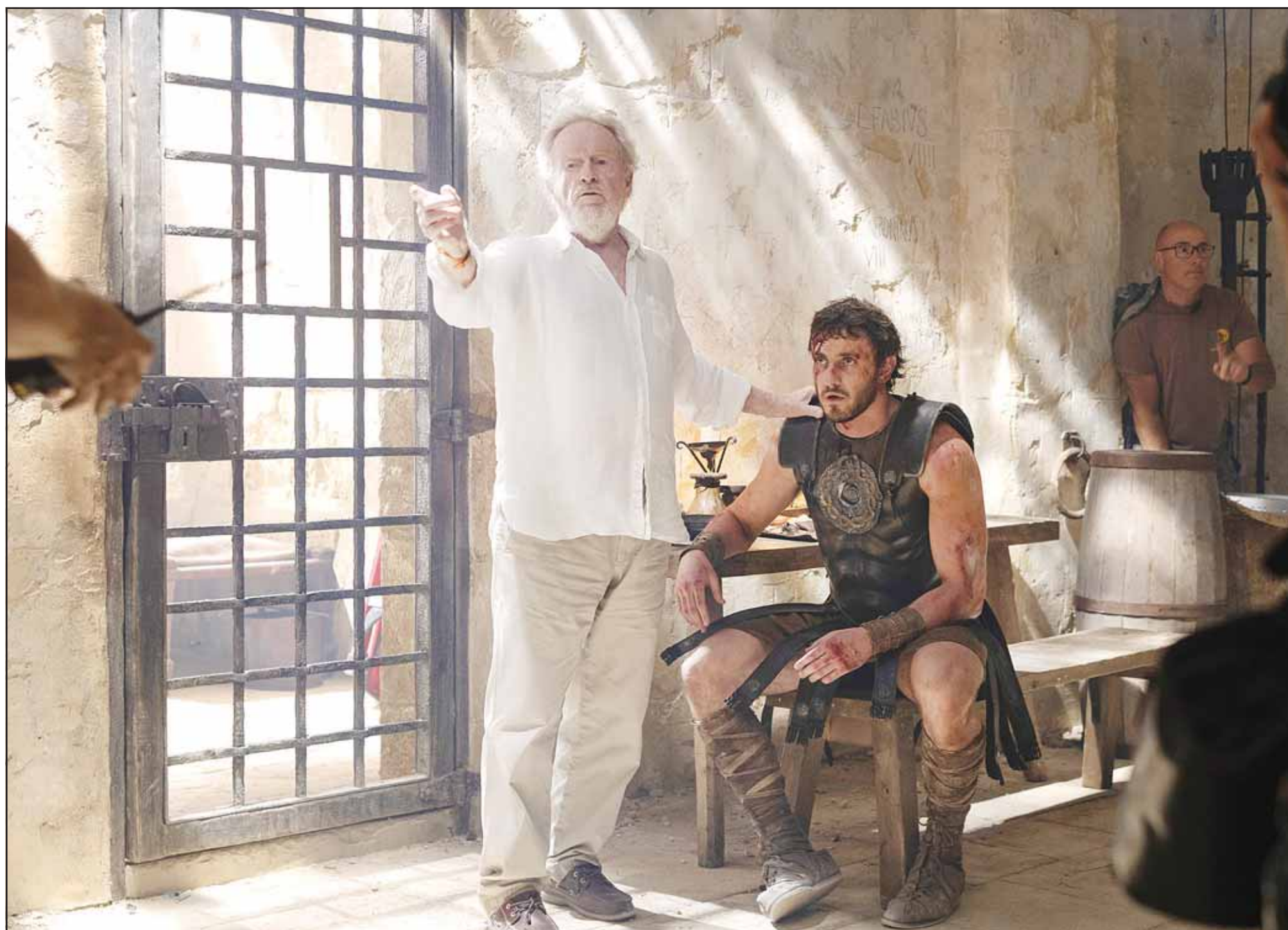
This image released by Paramount Pictures shows director Ridley Scott, center, Paul Mescal on the set of 'Gladiator II.'