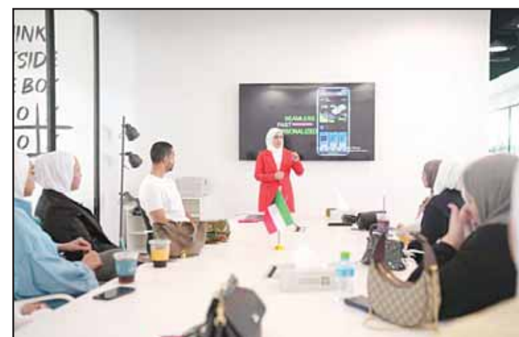
Review of Tam services.