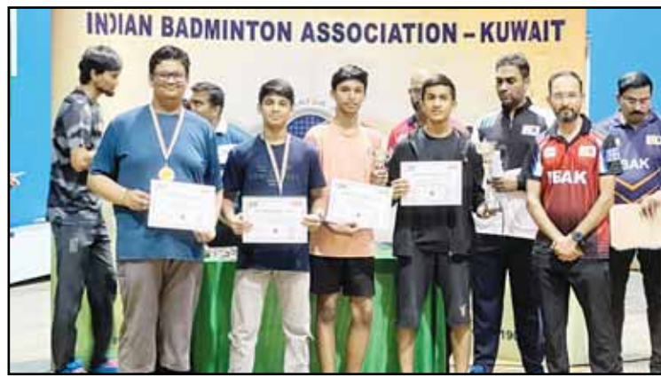
Left-right: Some of the winners on the podium.