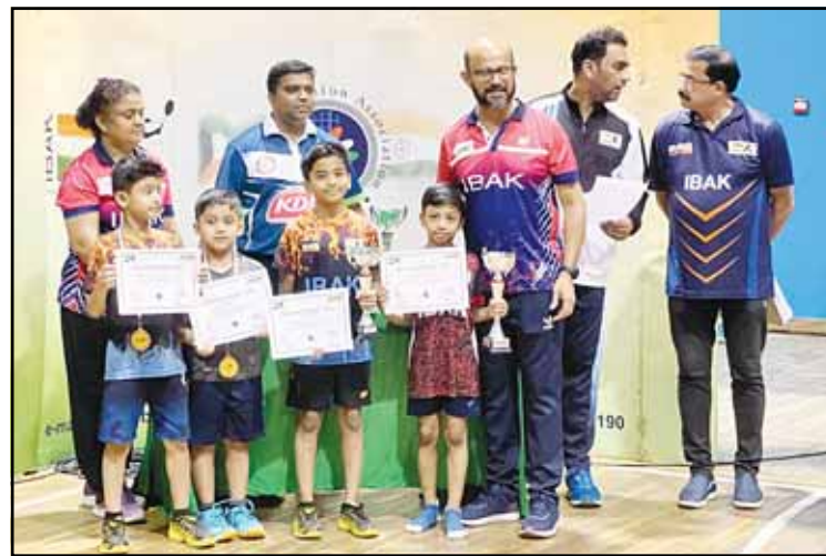
Top and above winners display their trophies.

The report also compared Real Madrid star Jude Bellingham playing many more games at the same age - 21 - than Wayne Rooney, a previous teenage star for England.