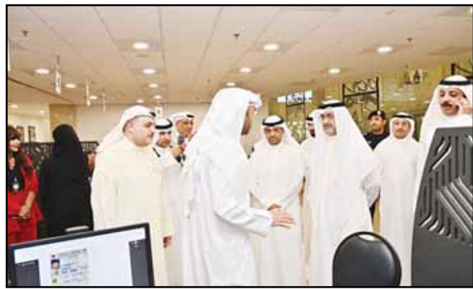
Governor of the Capital interacted with staff of the Capital Educational District.