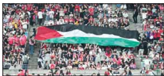
Spectators display Palestinian flags for the national anthem during the Asian qualifier Group B match for 2026 World Cup between South Korea and Palestine at Seoul World Cup Stadium in Seoul, South Korea.