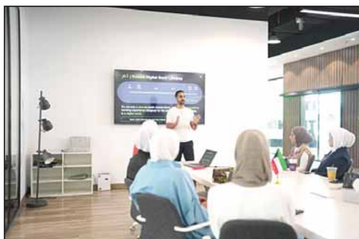
Review of Tam services.