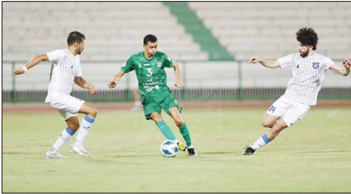
Players fighting for the ball during the friendly encounter.