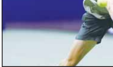
Jannik Sinner, of Italy, returns against Daniil Medvedev, of Russia, during the quarterfinals of the U.S. Open tennis championships, Wednesday, Sept in New York.

be score, this matchup was unusually topsy-turvy as they took turns domi-