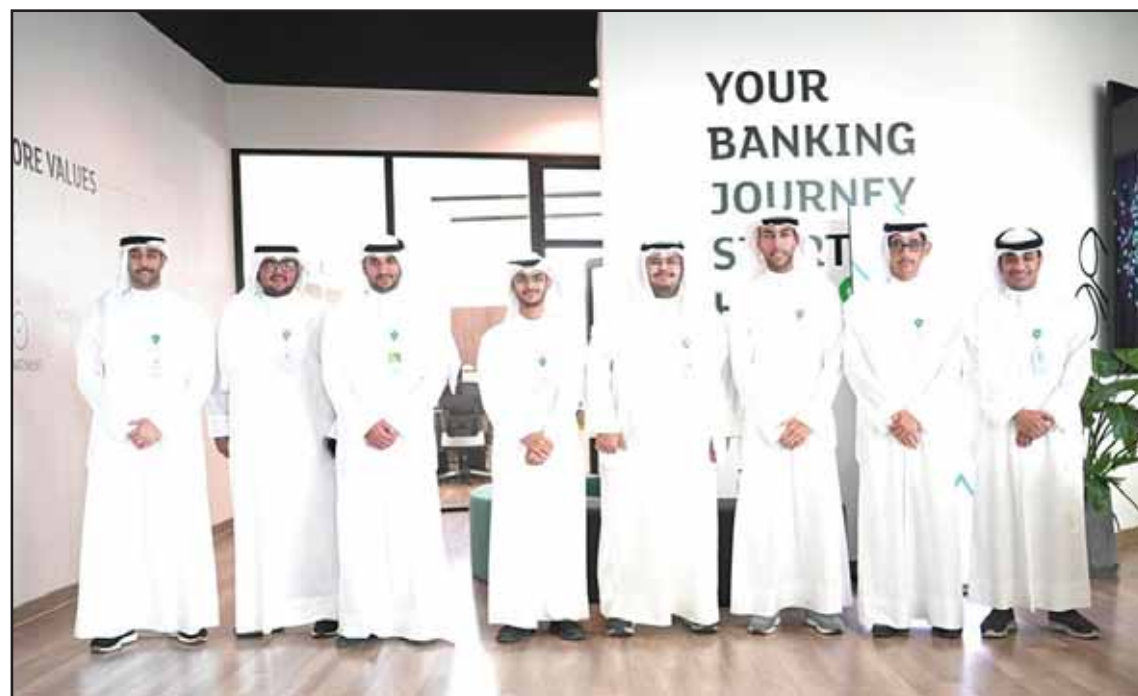
PR Academy trainees