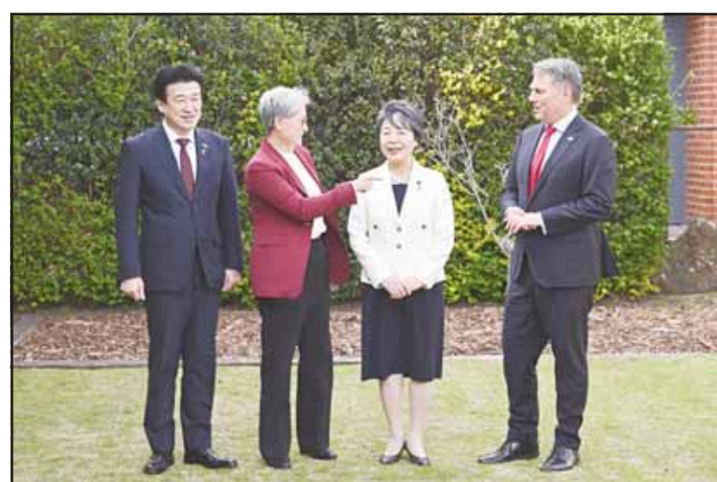
Japanese Defense Minister Minoru Kihara, left, Australian Foreign Minister Penny Wong, second left, Japanese Foreign Minister Yoko Kamikawa and Australian Defence Minister Richard Marles, right, pose for a photo in Queensland, Australia on Sept 5. Japan and Australia agreed on Thursday to increase joint military training exercises as their government ministers shared concerns over China's recent incursions into Japanese airspace and territorial waters.

Critics say the constitutional changes would deal a severe blow to the independence of the judiciary, and they question how such massive elections could be carried out without having drug cartels and criminals field their own candidates.