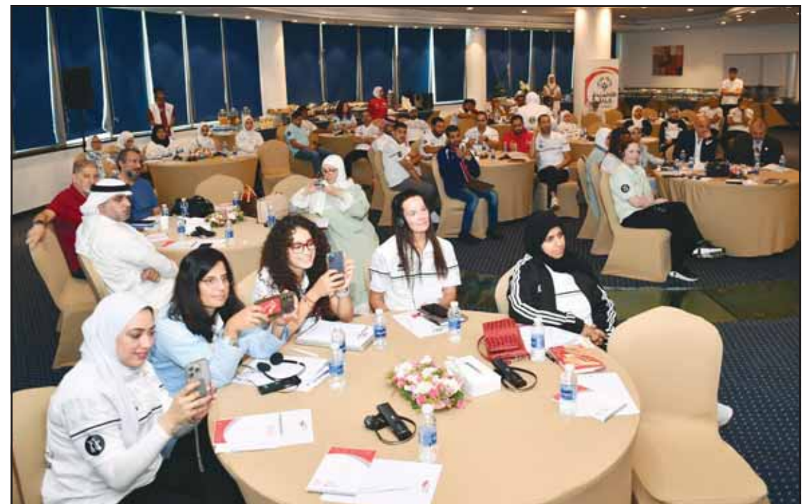
Participants enjoying proceedings.