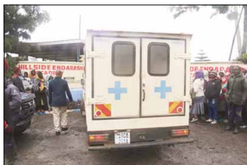
An ambulance drives inside the Hillside Endarasha Primary school following a fire incident in Nyeri, Kenya on Sept 6. A fire in a school dormitory in Kenya has killed 18 students and 27 others have been hospitalized, with 70 children unaccounted for, the country's deputy president said Friday.