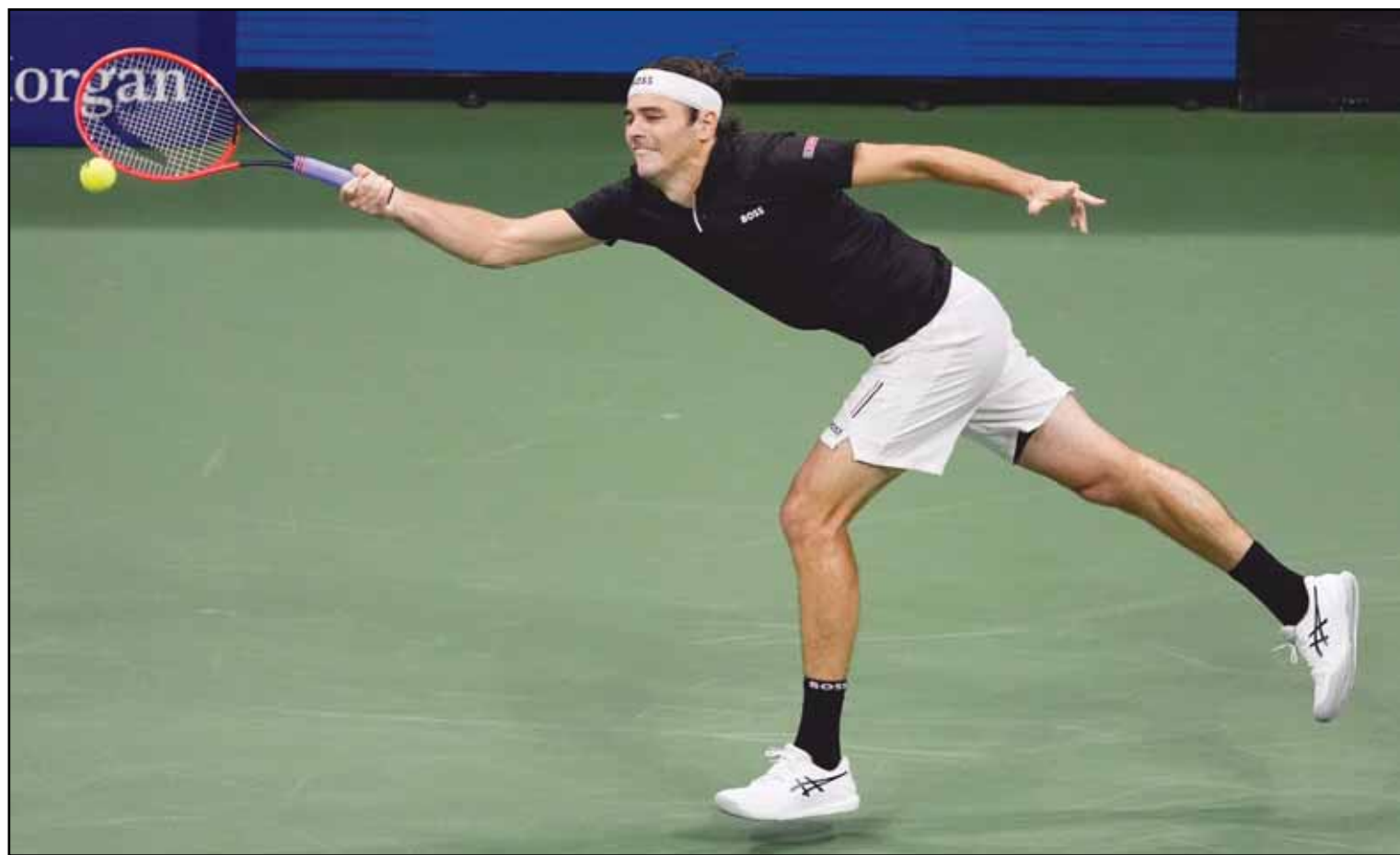
Taylor Fritz, of the United States, returns a shot to Frances Tiafoe, of the United States, during the men's singles semifinal of the U.S. Open tennis championships in New York.