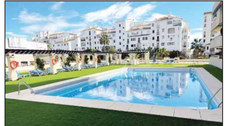
Spain's stable and attractive real estate market draws Kuwaiti buyers.