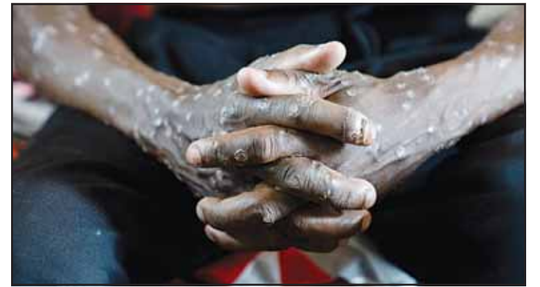
A man suffering from mpox waits for treatment at the Kamituga General Hospital in South Kivu Congo, Wednesday, Sept. 4.