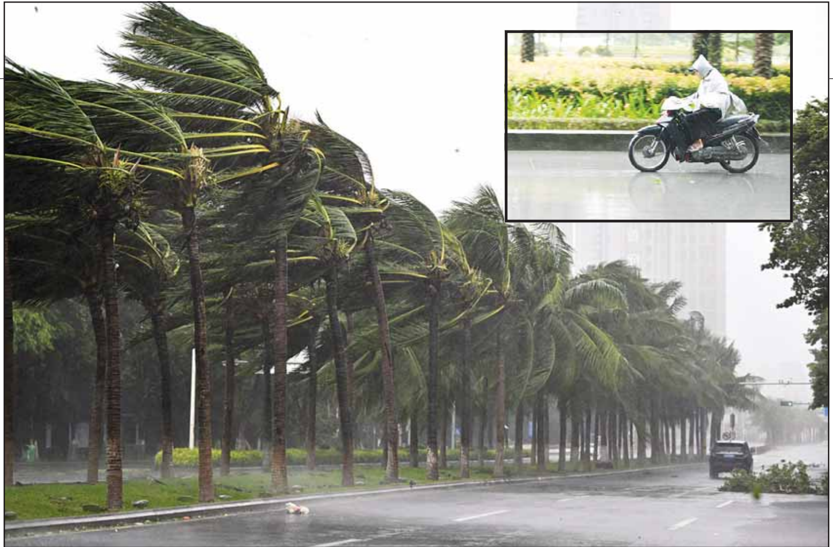
a vehicle moves past trees along a road in Haikou following the landfall of typhoon Yagi, in south China's Hainan Province, on Sept 6. Inset: A man rides a motorcycle in the rain caused by typhoon Yagi in Hanoi, Vietnam on Sept 7.

Justice Minister Thembi Simelane was only appointed to her position in June in the country's newly-formed government of national unity, after the former ruling African National Congress party lost its parliamentary majority in the May 29 election.