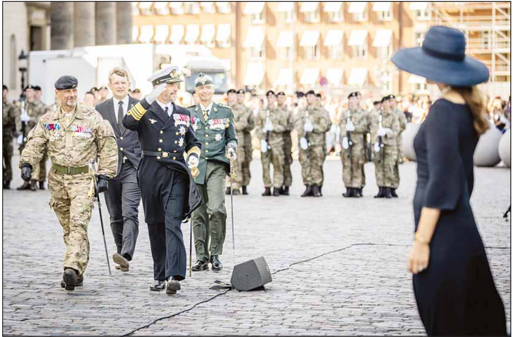
Denmark's King Frederik X, (third left), and Queen Mary, (right), at the parade during the flag day for Denmark's deployed at Christiansborg Palace Square in Copenhagen, on Sept. 5.

Police officers who were on guard duty locked the police station's door and the entrance to its interior courtyard. The suspect tried and failed to force them open, prosecutors said in a statement. Special forces officers were called to the scene and subdued him with a stun gun.