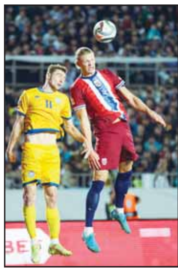
Kazakhstan's Yan Vorogovskiy, left, fights for the ball with Norway's Erling Haaland, right, during the UEFA Nations League soccer match between Kazakhstan and Norway at Ortalyk Stadium in Almaty, Kazakhstan.

The European qualifying groups for the 2026 World Cup will be drawn in Zurich in December, likely with seedings decided by FIFA world rankings updated in November after Nations League group play ends.