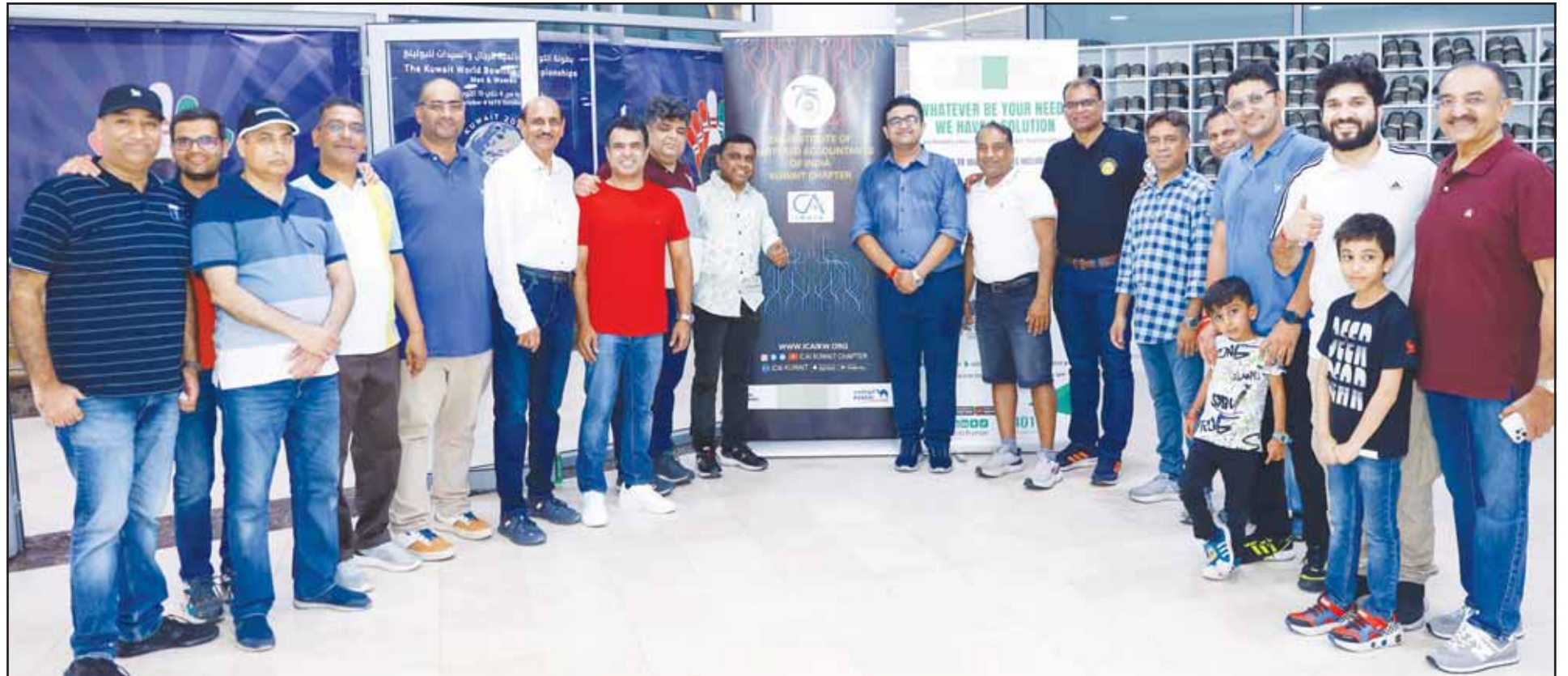
Participants pose for a group photo.

Haaland has seven goals in three Premier League matches for Manchester City this season and hadn't been held scoreless for nearly a month - since City won the Community Shield in a penalty shootout over Manchester United on Aug. 10. Haaland did find the