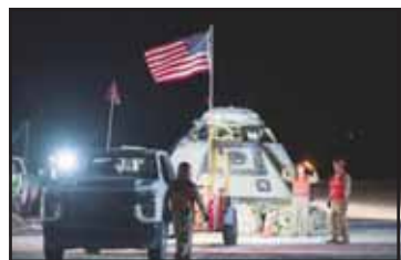
Boeing and NASA teams work around NASA's Boeing Crew Flight Test Starliner spacecraft after it landed uncrewed, Friday, Sept. 6.

radioed as the white and blue-trimmed capsule undocked from the space station 260 miles (420 kilometers) over China and disappeared into the black void. Williams stayed up late to see how everything turned out. "A good landing, pretty awesome," said Boeing's Mission Control.