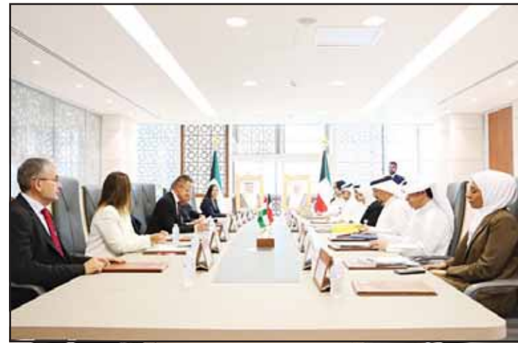
Minister of Finance, Minister of State for Economic Affairs and Investment Nora Al-Fassam meets with Hungarian Minister of Foreign Affairs and Commerce Peter Szijjarto.

The two sides affirmed their mutual aspiration to make the best results possible from the forthcoming fifth