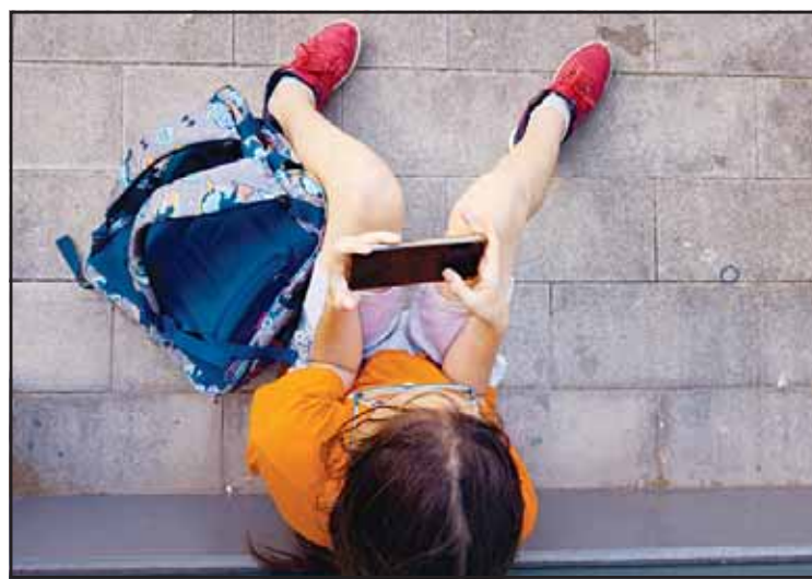
An 11-year-old boy plays with his father's phone outside school in Barcelona, Spain, Monday, June 17, 2024.

So what happens when you break your own rules - especially when those rules are in place to protect your children? You're primed to feel guilt, and because guilt is its own form of stress, this dynamic sets up tension that can be