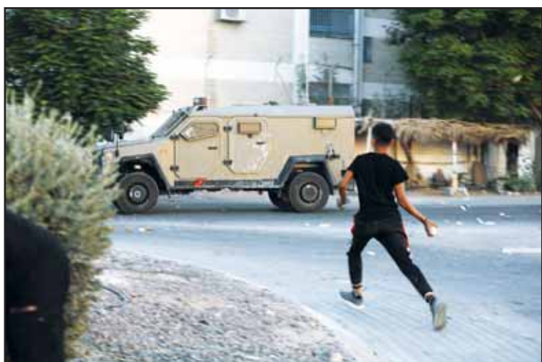
A young Palestinian throws a stone at an Israeli armoured carrier.