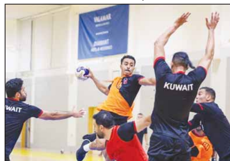
Players intensify training for the championship.

bia, and Al-Sha'la from Yemen, had withdrawn from the competition.