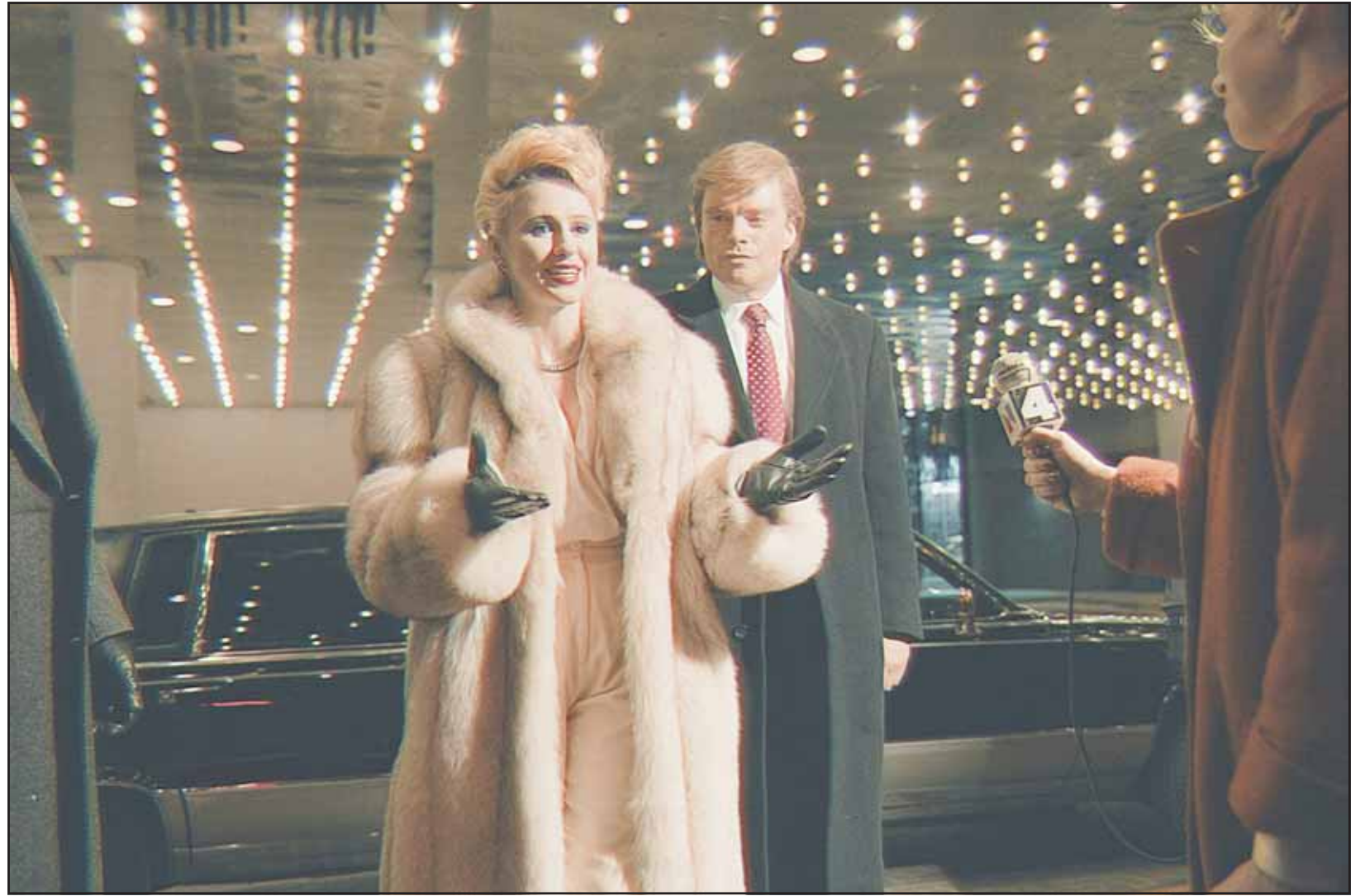
This image released by Briarcliff Entertainment shows Maria Bakalova, (left), and Sebastian Stan in a scene from the film 'The Apprentice.'

"They all know things that I don't know," she says. "I go into this as I would go into a conversation with a friend. I say, 'Here's something that troubles me. I wonder if it troubles you. Let's take a walk. I'm going to give you a story. I'm going to give you a reason to turn the page while we take this walk.'"