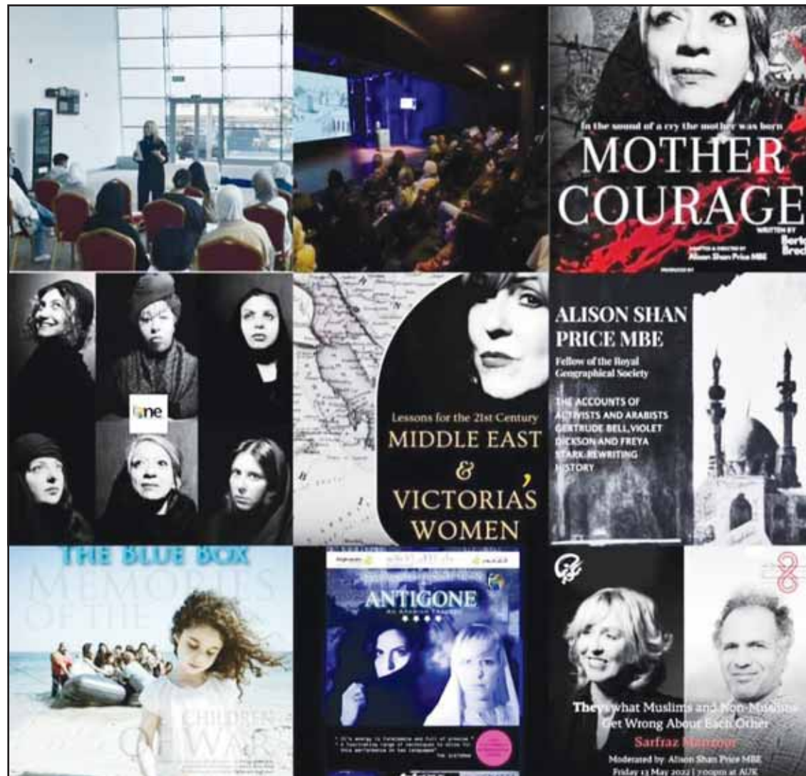
Combo photos of productions and lectures in Kuwait.