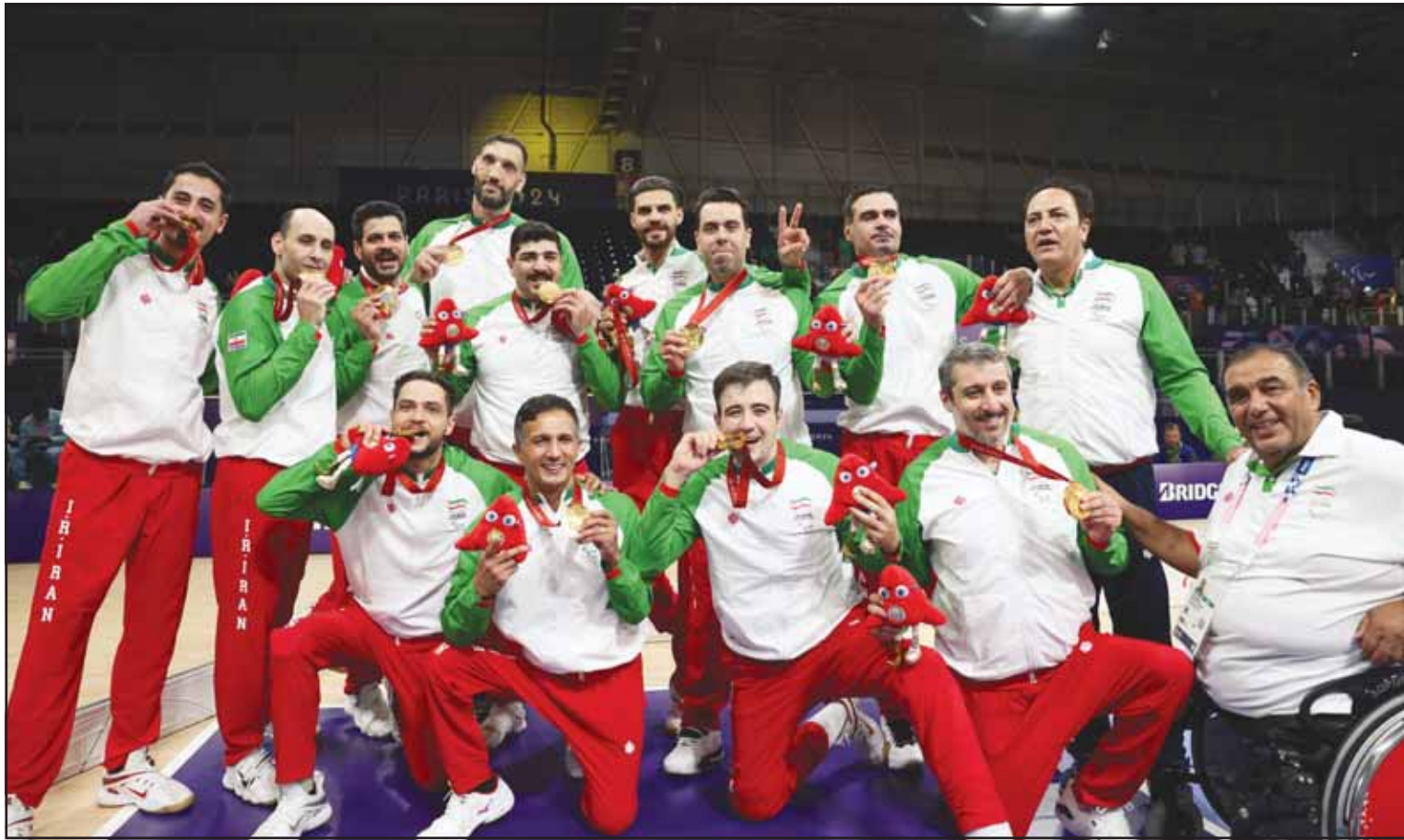
Iran Men's Sitting Volleyball Team poses after winning the Men's Gold Medal Match in Paris, France.

PARIS, Sept 7, One month after Tara Davis-Woodhall's Olympic title in the long jump, her husband Hunter Woodhall, a double amputee, won his own Paralympic gold medal Friday at the Stade de France.