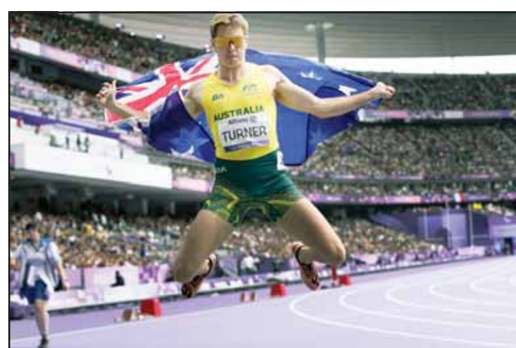
Australia's James Turner celebrates after winning the Men's 100 M. T36 at the 2024 Paralympics in Paris, France.

The day before, Kamiji won her first gold medal in the doubles with Japan teammate Manami Tanaka. They beat