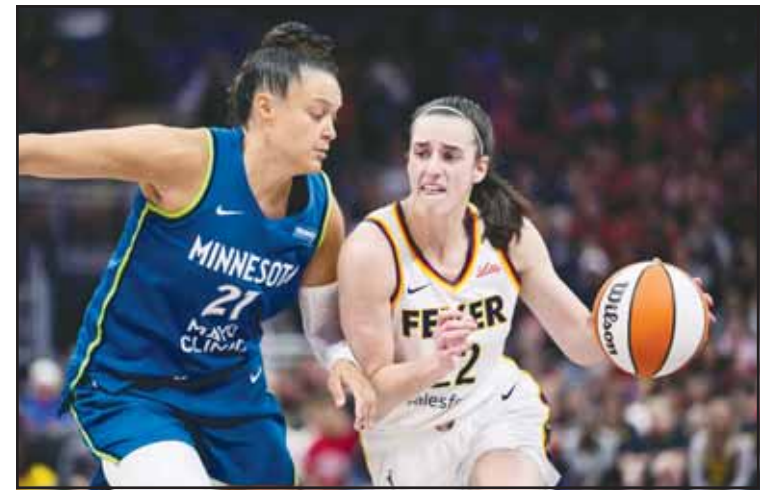
Indiana Fever guard Caitlin Clark (22) drives on Minnesota Lynx guard Kayla McBride (21) in the second half of a WNBA basketball game in Indianapolis.

Brianna Jones led Connecticut (24-10) with 17 points. Marina Mabrey scored 15, while DeWanna Bonner totaled 11 points and nine rebounds. Alyssa Thomas had 10 rebounds but also had eight of the