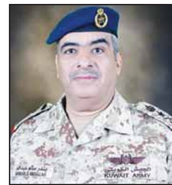
Lt. Gen. Al-Muzain