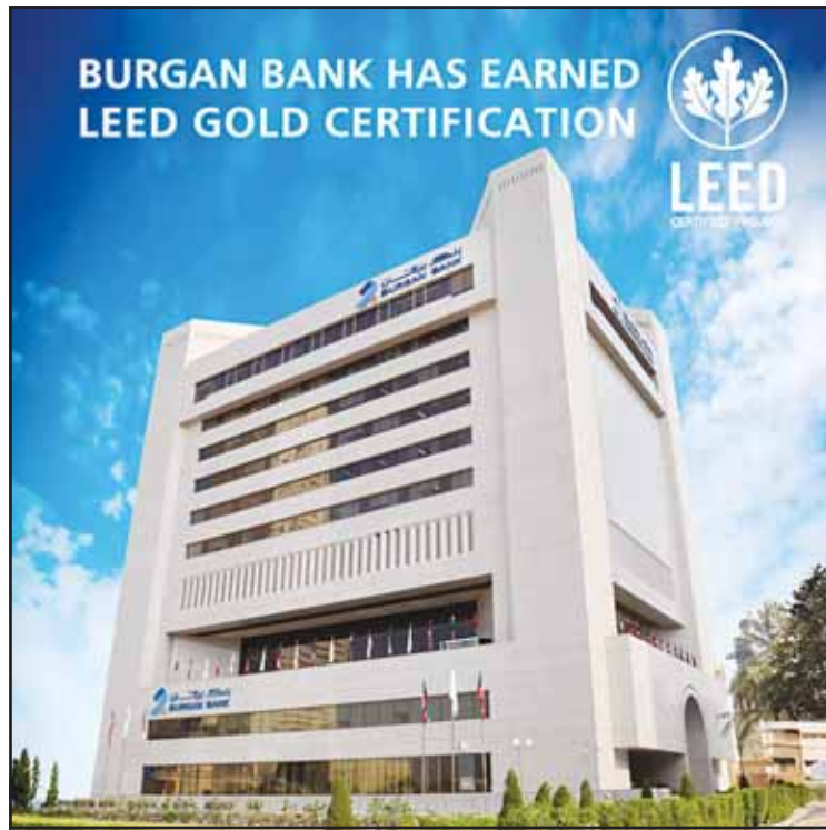
Burgan Bank head office building