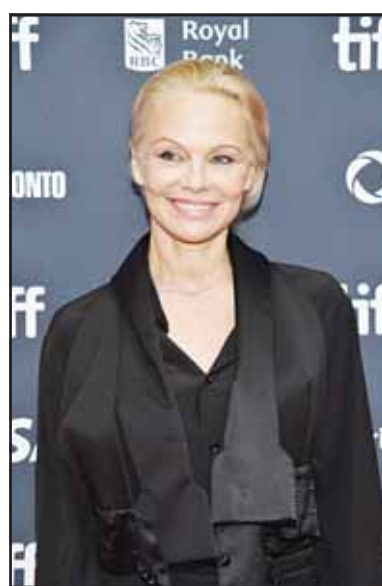
Pamela Anderson attends the premiere of 'The Last Showgirl' during the Toronto International Film Festival on Friday, Sept. 6, 2024, at Princess of Wales Theatre in Toronto. (AP) - Details Page 11

The CMA said it would scrutinize whether Ticketmaster, the UK's biggest seller of tickets, may have engaged in unfair commercial practices and whether it breached consumer protection law. (AP)