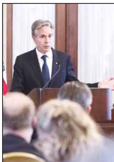
US Secretary of State Antony Blinken gives a joint press conference with Dominican Republic President Luis Abinader at the National Palace in Santo Domingo on Sept 6. Blinken and Abinader held private talks on Friday on a range of issues, from human rights, economic prosperity and regional security.

Hun Manet, speaking at a ceremony for law school graduates, defended the crackdown, saying the authorities must protect the social order and security for the sake of all Cambodians, and accused the protesters of seeking to overthrow his government.