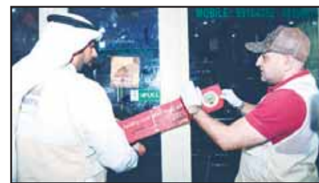
PAFN officials sealing one of the violating food facilities.

He also clarified that settlement is permissible for certain violations; but not the violations related to food safety and public health, adding the