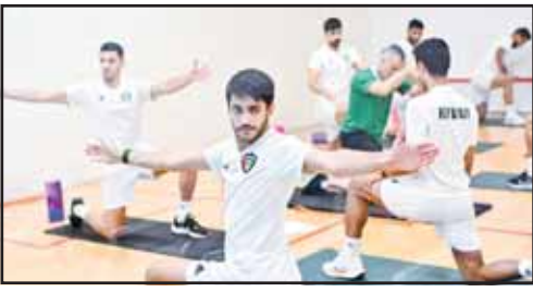
Kuwaiti players preparing for the upcoming World Cup qualifying match against Iraq.