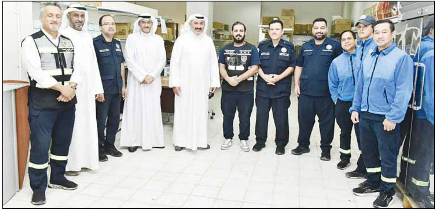
Dr. Al-Shatti surrounded by a number of 'Medical Emergency' officials and paramedics.

The campaign also distributed 1,200 copies of the first edition of the "A Paramedic in Every Home" brochure and 100 copies of the second edition, along with electronic versions for broader accessibility.