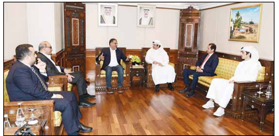
Kuwait's Minister of Information and Culture and Minister of State for Youth Affairs Al-Mutairi receiving the Iraqi minister.

The committee suggested that the proposal be forwarded to the Development and Information sector of the Information Systems Department for the creation of an application for the service.