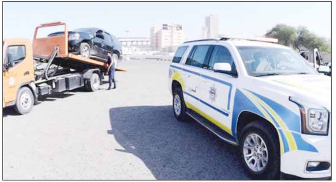
One of the seized cars being pulled onto the ministry trailer.