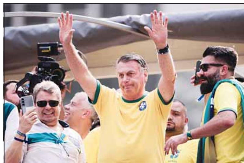
Former Brazilian president Jair Bolsonaro waves to supporters during a protest calling for the impeachment of Supreme Court Minister Alexandre de Moraes, who recently imposed a nationwide block on Elon Musk's social media platform X, in Sao Paulo on Sept 7. Saturday's march was seen as a test of Bolsonaro's capacity to mobilize turnout ahead of the October municipal elections, even though Brazil's electoral court has barred him from running for office until 2030. (AP)

The region shaken by the earthquake is full of impoverished agricultural villages like Imi N'tala, accessible only via bumpy, unmaintained roads. Associated Press reporters revisited half a dozen of them last week ahead of the first anniversary. (AP)