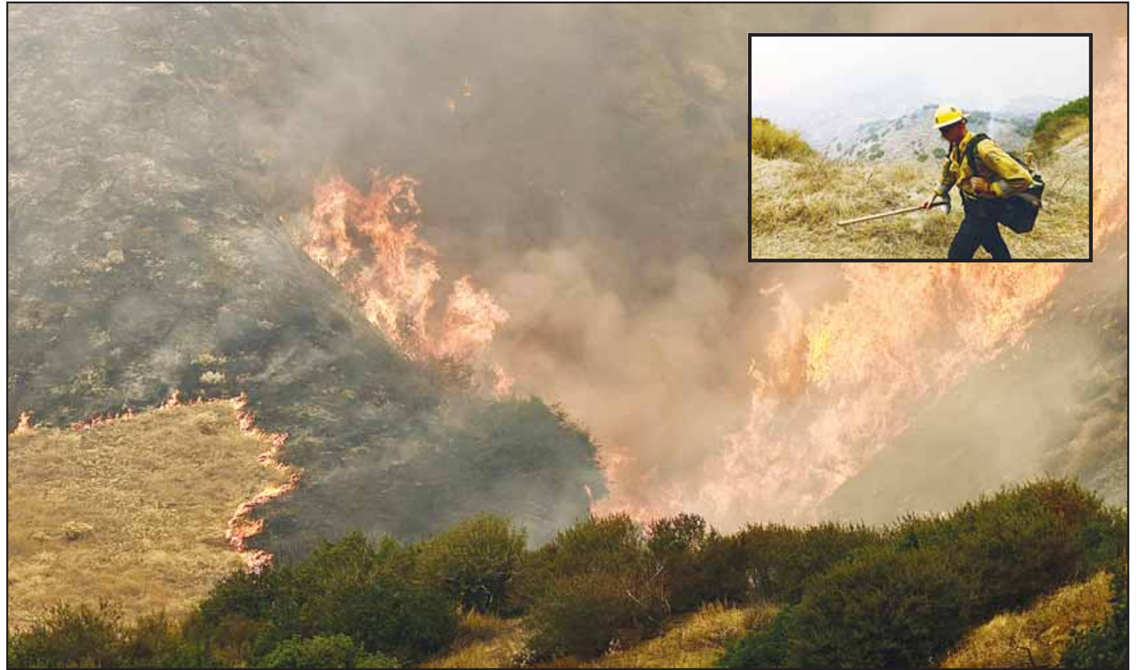
This photo taken on Sept 7, 2024 shows a wildfire in San Bernardino County, California. Inset: A firefighter works at the site of a wildfire.

In Ukraine, two civilians died and four more suffered wounds in a nighttime Russian airstrike on the northern city of Sumy, the regional military administration reported.