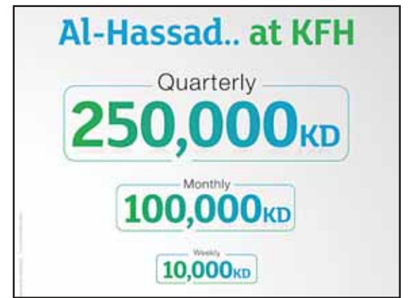
KFH AlHassad winners

which the deposited amounts are invested in Al-Hassad based on the Wakala principle.