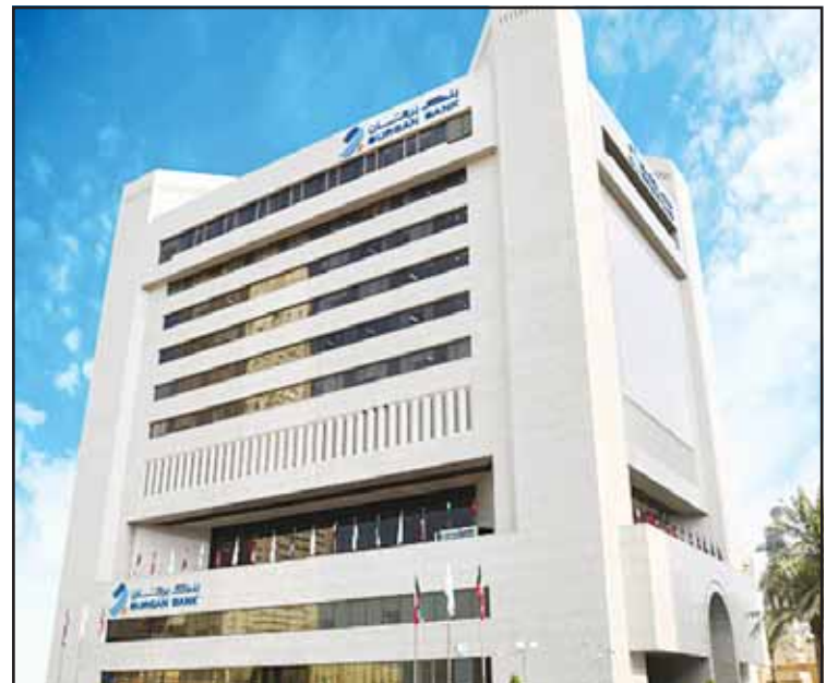
Burgan Bank headquarters.

It is worth noting that The Banker magazine, founded in 1926, is owned by the Financial Times Group – one of the most recognized magazines with a focus on international financial affairs – and is considered a reliable source for financial analysis and data-based reports. It enables leaders and experts in the financial sector to remain up to date with the latest global trends in the financial sector and banking industry, and to make operational and strategic decisions through the specialized research and reports it publishes.