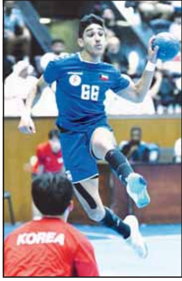
A Kuwaiti goes for a goal.