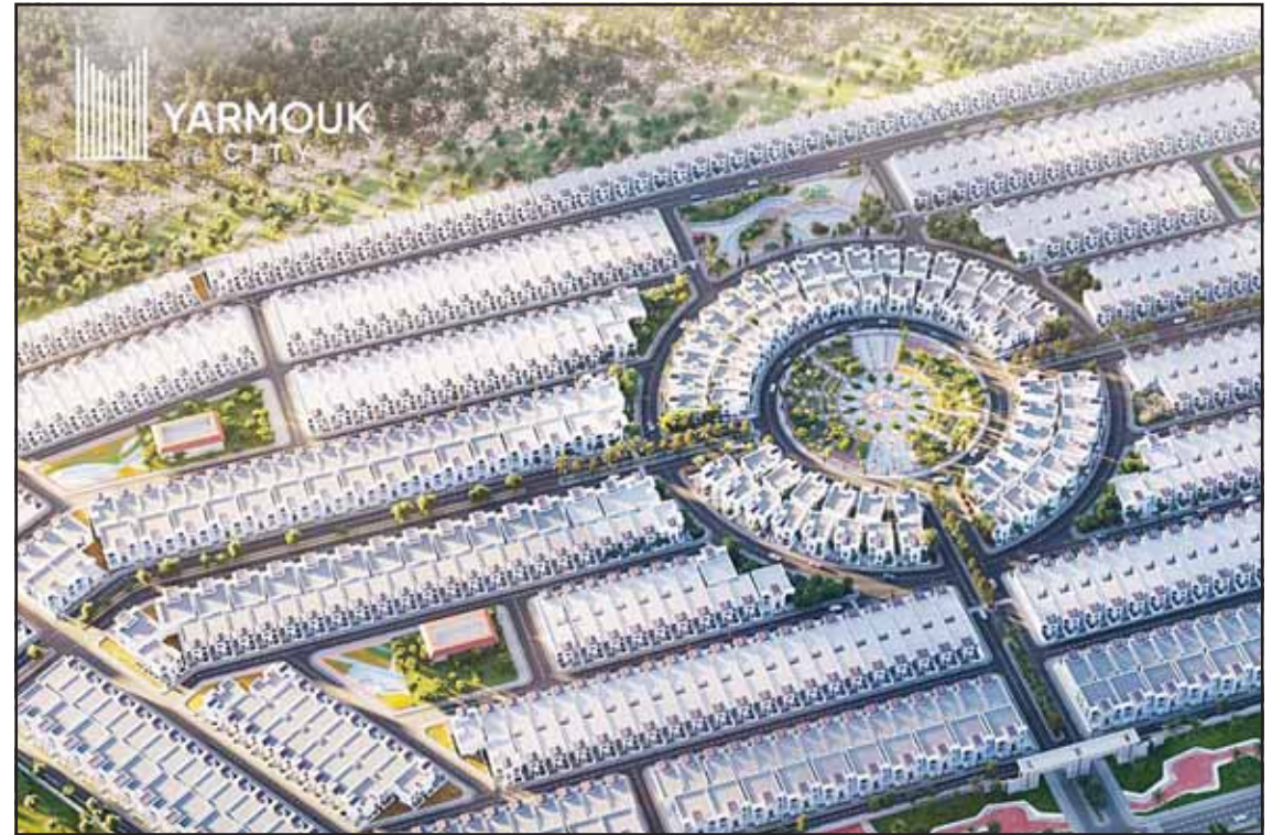
A picture of the 'Yarmouk City' residential complex in Baghdad.