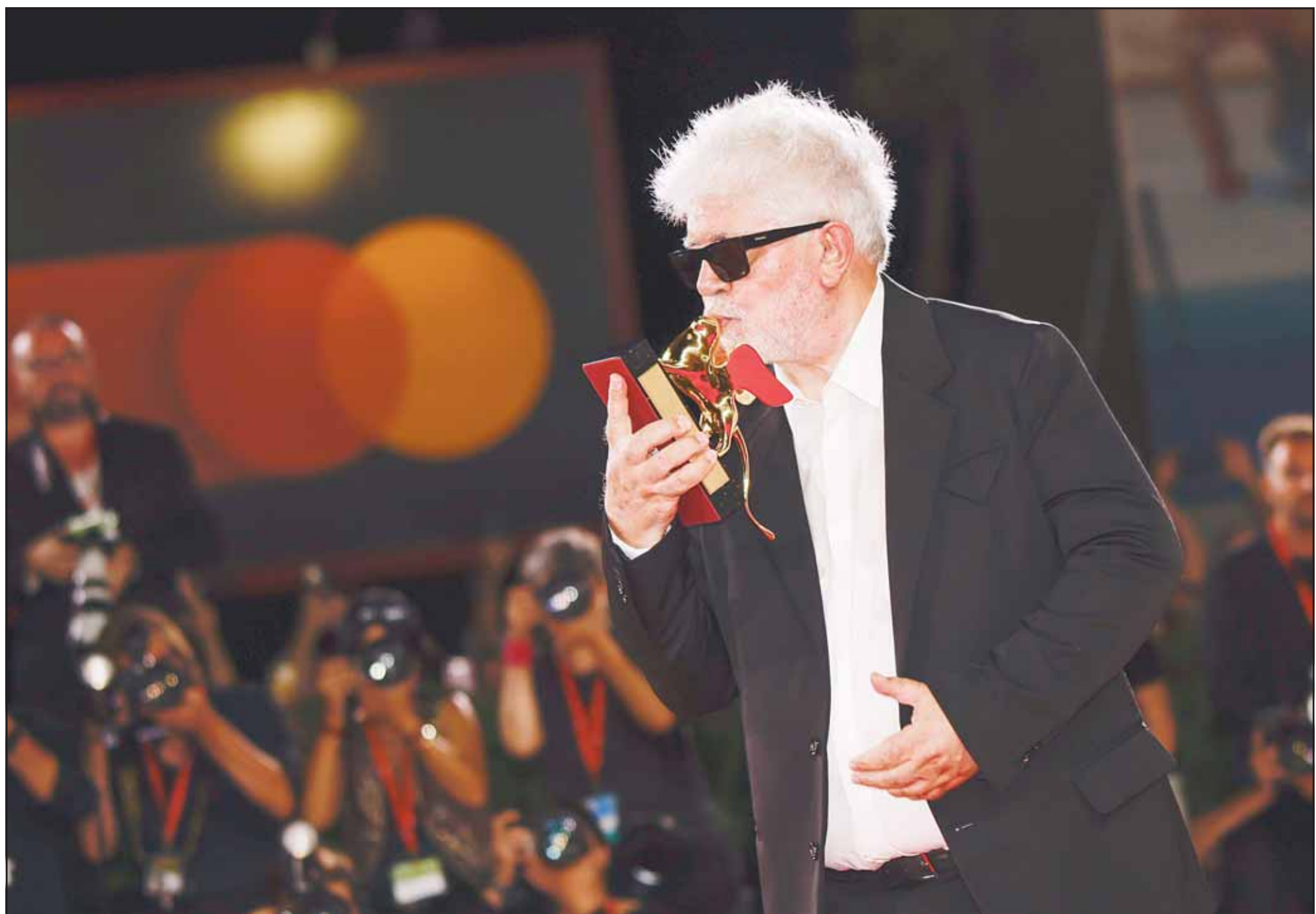
Pedro Almodóvar, winner of the Golden Lion for best film for ‘The Room Next Door’, poses for photographers at the awards photo call during the closing ceremony of the 81st edition of the Venice Film Festival in Venice, Italy, on Saturday, Sept. 7.