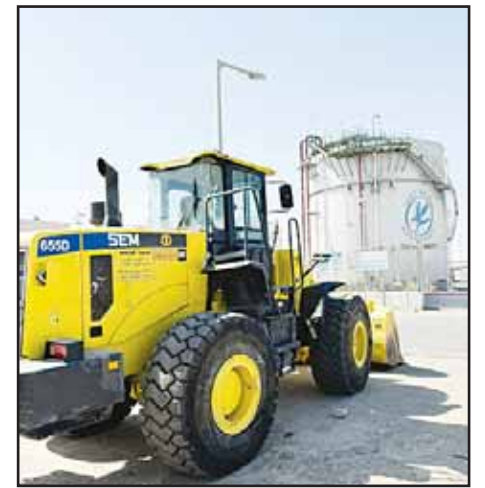
Removal of illegal structures.

Bid to reorganize 'plot': Kuwait Municipality has granted the final approval for reorganizing part of Plot No. 4 in Siddeeq in accordance with Regulatory Plots Organization Law No. 40/1978 and Ministerial Resolution No. 325/2023 on the