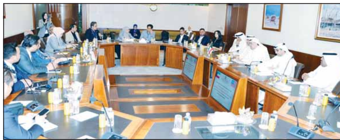
Part of the meeting of the Malaysian delegation at the Kuwait Chamber of Commerce and Industry.

The new building is expected to alleviate congestion and create a more efficient environment for both visitors and staff. The project has been carefully coordinated with PACI to ensure all necessary requirements are met.