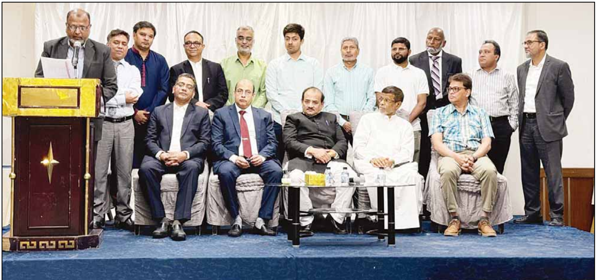
Photo during the meeting.