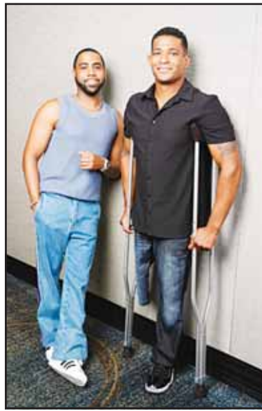
Jharrel Jerome, (left), the star of 'Unstoppable,' and the film's subject Anthony Robles pose together to promote the film during the Toronto International Film Festival, Friday, Sept. 6, in Toronto.