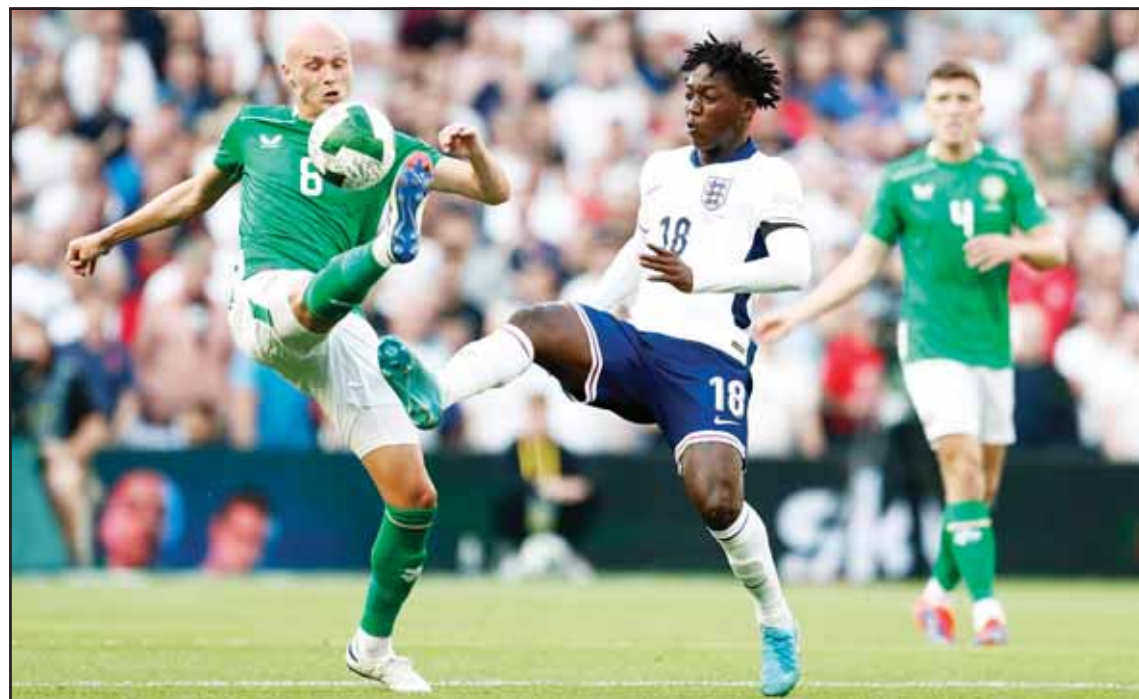
Ireland's Will Smallbone, left, vies for the ball with England's Robbie Mainoo during the UEFA Nations League soccer match between Ireland and England at the Aviva stadium in Dublin, Ireland.

Armenia beat Latvia 4-1 in Group C4, while there was a penalty for each team as the Faroe Islands and North Macedonia drew 1-1. In Group D2, Moldova beat Malta 2-0.