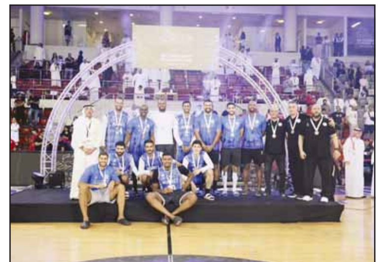
The Kuwaiti team celebrates on the podium.