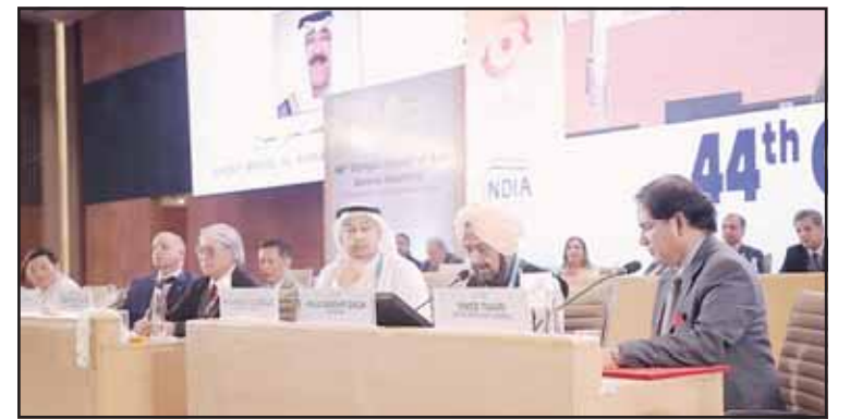
The Asian Olympic Council meeting in progress.