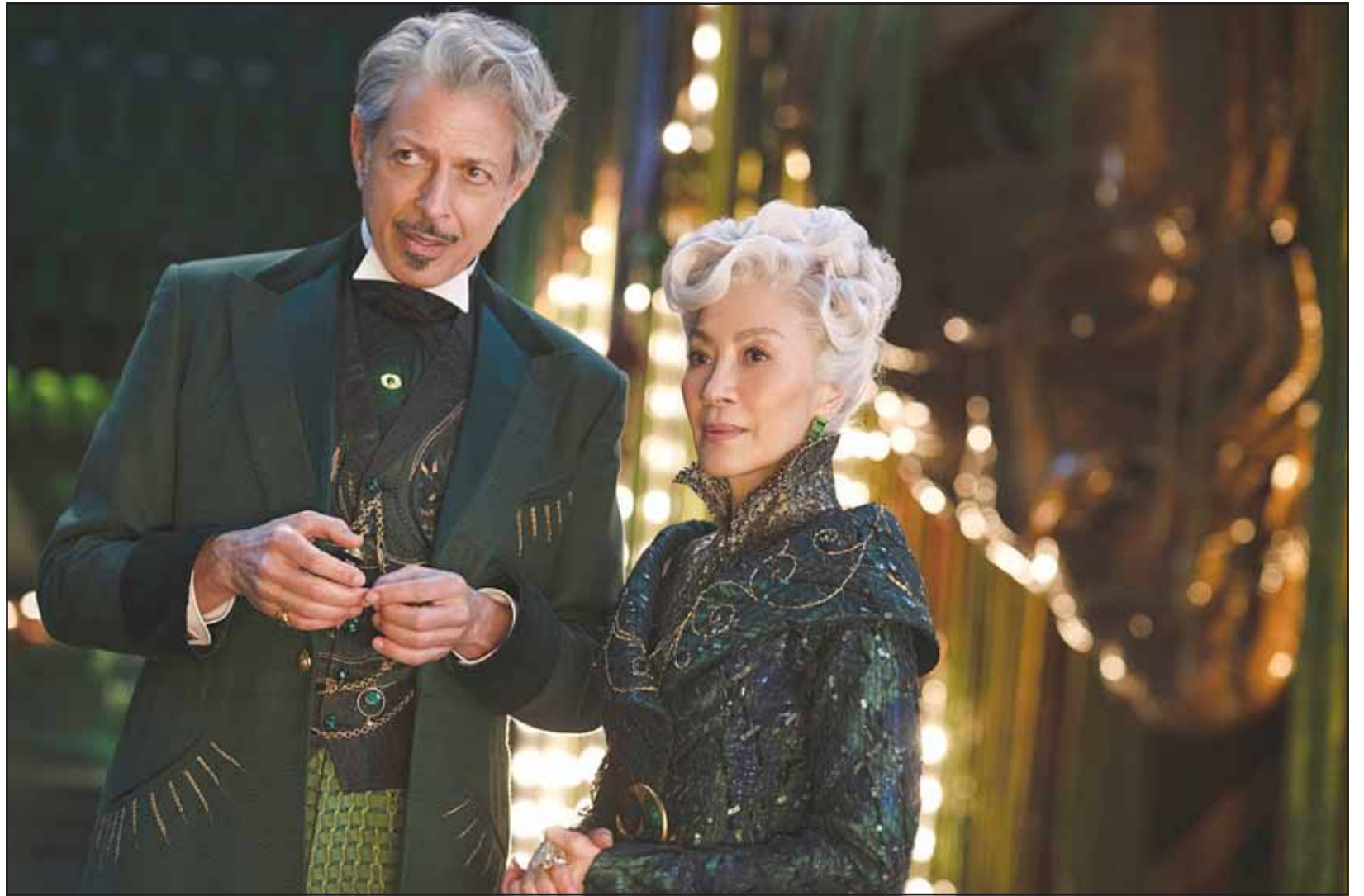
This image released by Universal Pictures shows Jeff Goldblum as The Wizard of Oz, (left), and Michelle Yeoh as Madame Morrible in a scene from the film 'Wicked.'

The play was a hit with critics, with Time Out calling it a "sprawling maximalist monolith, a gargantuan entertainment that goes beyond being a mere 'play,'" and the Guardian saying, "This is breathtaking theatre with its own arresting imagination."