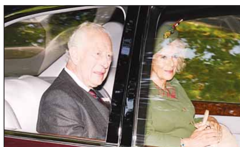
King Charles and Queen Camilla arrive at Crathie Kirk, near Balmoral, for Sunday church service on Sept 8. Charles attended church for prayers and reflection in remembrance of his mother Queen Elizabeth II on Sunday, the second anniversary of her death.

'Boy fatally stabbed by brother': A 2-year-old boy was fatally stabbed by his 6-year-old brother in Joliet, Illinois, police said.