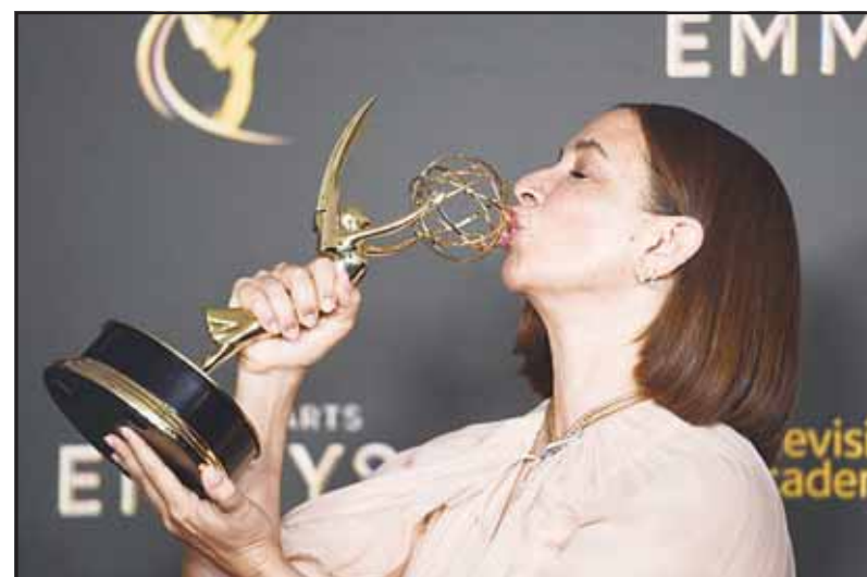
Maya Rudolph kisses her trophy for outstanding character voice-over performance on 'Big Mouth' on night one of the Creative Arts Emmy Awards on Saturday, Sept. 7, in Los Angeles. — Details Page 11

Prize judges called the book "brutally clear, honest and, best of all, funny." Rushdie won the Booker Prize for fiction in 1981 for "Midnight's Children." He spent years in hiding after Iran's Ayatollah Khomeini issued a fatwa, or edict, in 1989 calling for his death for the alleged blasphemy in his novel "The Satanic Verses."