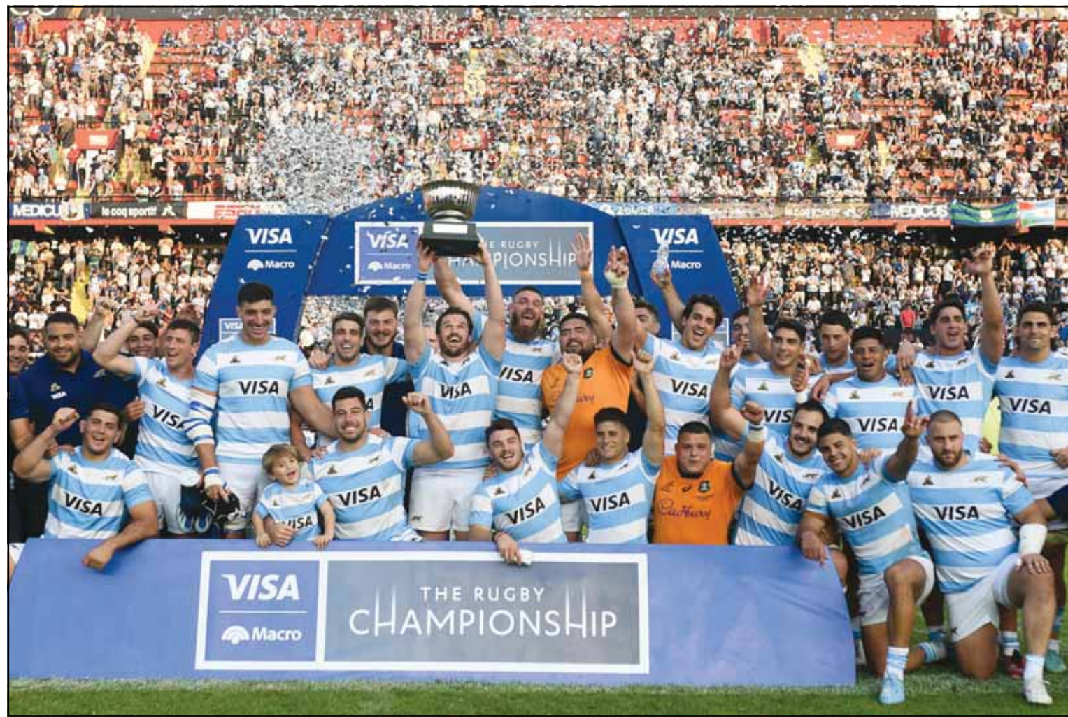
Argentina's Los Pumas celebrate defeating Australia in a rugby championship test match in Santa Fe, Argentina.

The All Blacks, slower to clear their bench than South Africa, were