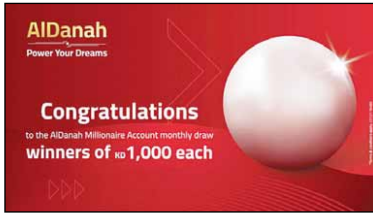
AIDanah monthly draw

The grand prize for the annual draw is KD 2 million, and the semi-annual prize is KD 1 million. Each month, 10 winners are selected, with each receiving