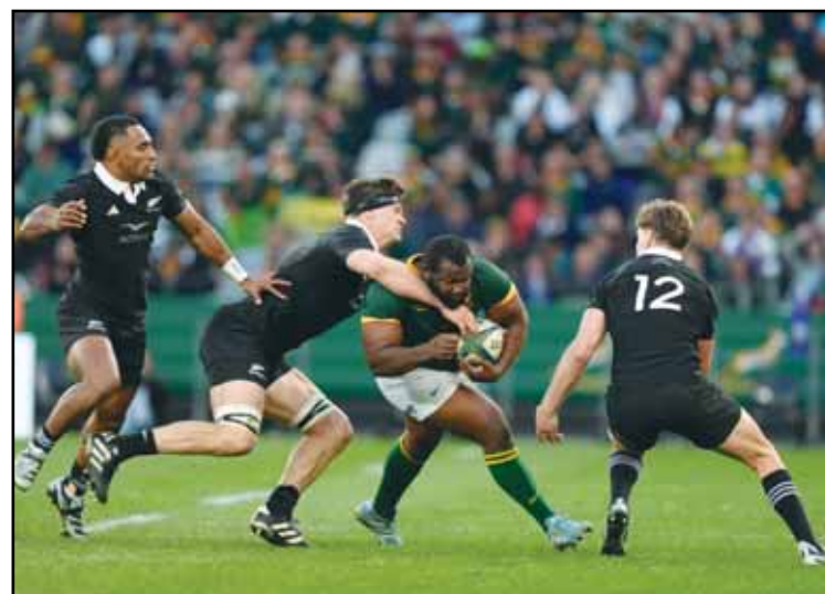
New Zealand's Scott Barrett, left, tackles South Africa's Ox Nche during a rugby championship test match between South Africa and New Zealand at Cape Town Stadium, South Africa.

There was plenty of time for the Pumas to a late double for fullback Juan Cruz Mallia, Oviedo to notch his second try, and Cinti to cap the match with Argentina's ninth try.