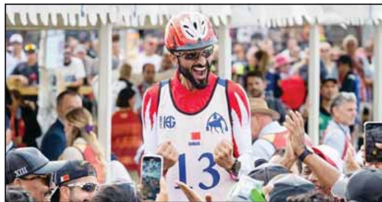
Sheikh Nasser celebrating his victory.

Khalifa, Crown Prince of Bahrain, attended the championship and highlighted Bahrain's significant progress in endurance racing. He