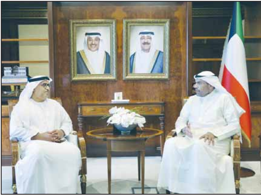
Kuwait's Minister of Foreign Affairs Al-Yahya receiving the UAE ambassador.