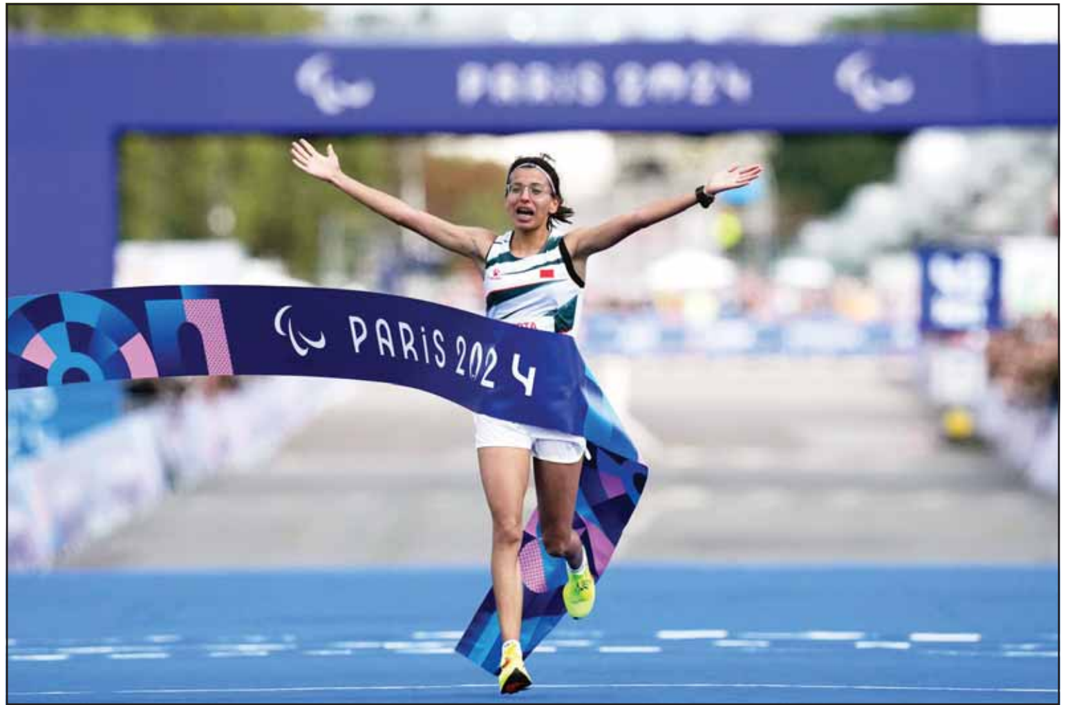
Morocco's Fatima Ezzahra El Idrissi wins the women's marathon T12 at the 2024 Paralympics in Paris, France.

Debrunner, the world record holder, finished in 1:41:50, more than