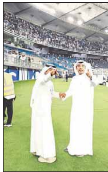
Minister Al-Mutairi follows the events that accompanied the match.