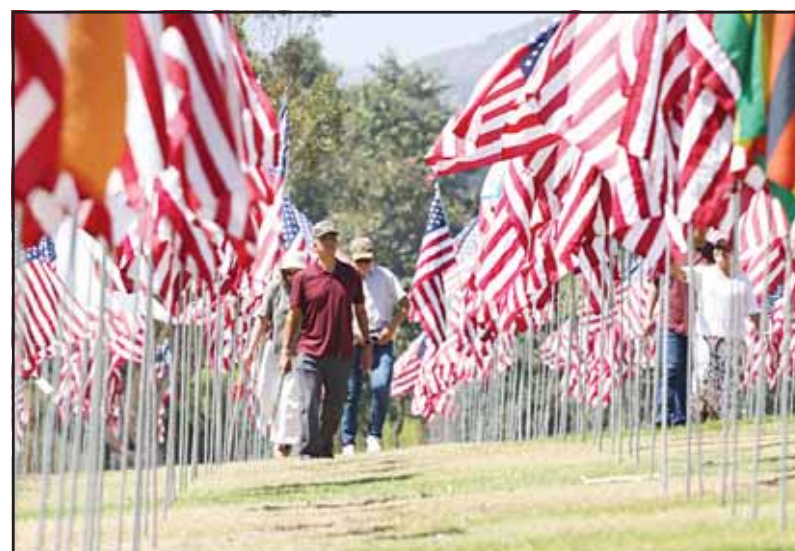
People walk among the Waves of Flags at Pepperdine University in Malibu, California, the United States, on Sept 10. Each September, the university stages the Waves of Flags display to honor the victims of the 9/11 attacks.

3-year-old girl dies in hot car: A 3-year-old girl died after being found unconscious inside a hot car with her mother in Southern California during a heat wave