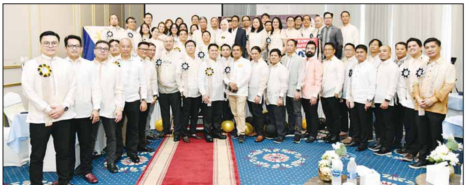
Photos during the event.