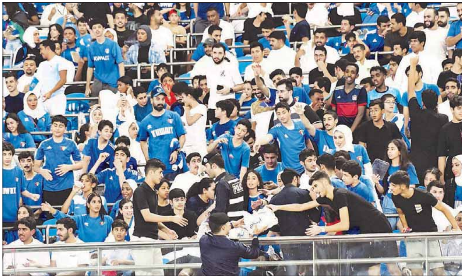
Fans getting help from the security personnel during the Kuwait-Iraq World Cup qualifying match at the Jaber Stadium in Kuwait.