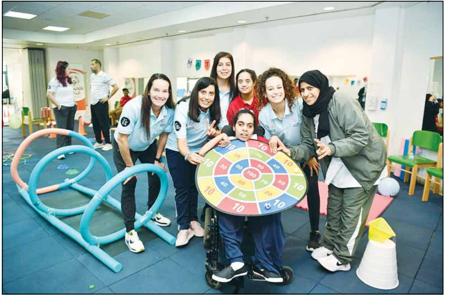
Participants pose for a group photo at the end of the program.