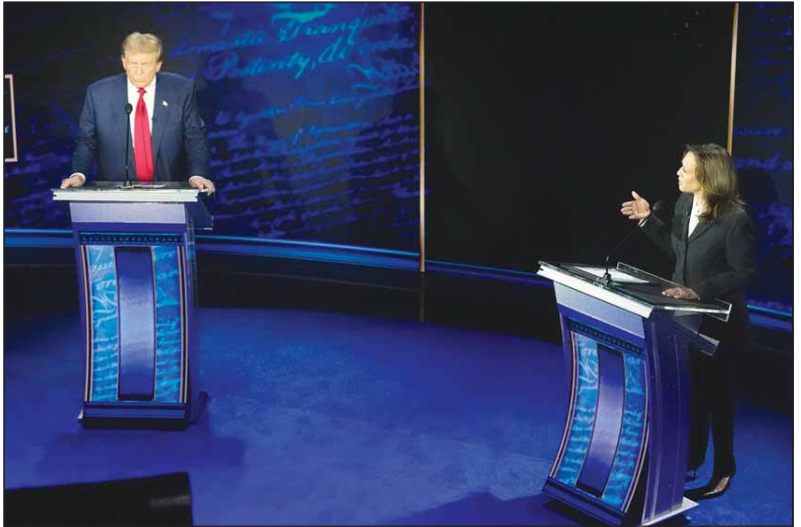
US Republican presidential nominee former president Donald Trump and Democratic presidential nominee Vice President Kamala Harris participate during an ABC News presidential debate at the National Constitution Center on Sept 10 in Philadelphia.

The trip will begin in Australia before the king and Queen Camilla travel to Samoa for the Commonwealth heads of government meeting, which takes place every two years. Although the tour was first announced in July, no dates were released at that time.