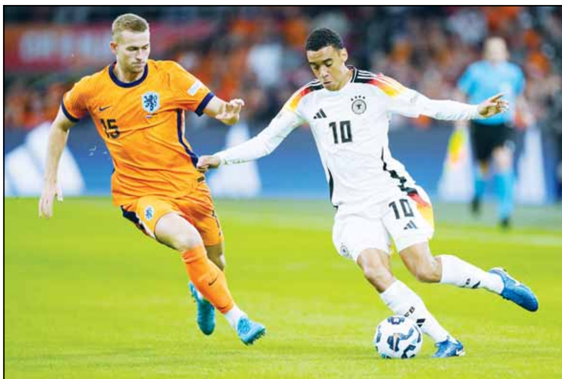
Matthijs De Ligt of the Netherlands, left, and Germany's Jamal Musiala fight for the ball during the UEFA Nations League soccer match between Netherlands and Germany in Amsterdam, Netherlands.

PSG left Mbappé out of the team's opening league game of that season as the standoff continued but eventually let him return to the lineup after "constructive and positive talks" between the two parties, PSG said at the time.