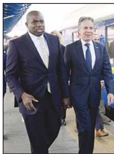
US Secretary of State Antony Blinken and British Foreign Secretary David Lammy arrive at the train station in Kyiv, Ukraine on Sept 11. The British Foreign Secretary joined his American counterpart on a visit to Ukraine to discuss the country's military needs in its fight against Russia.