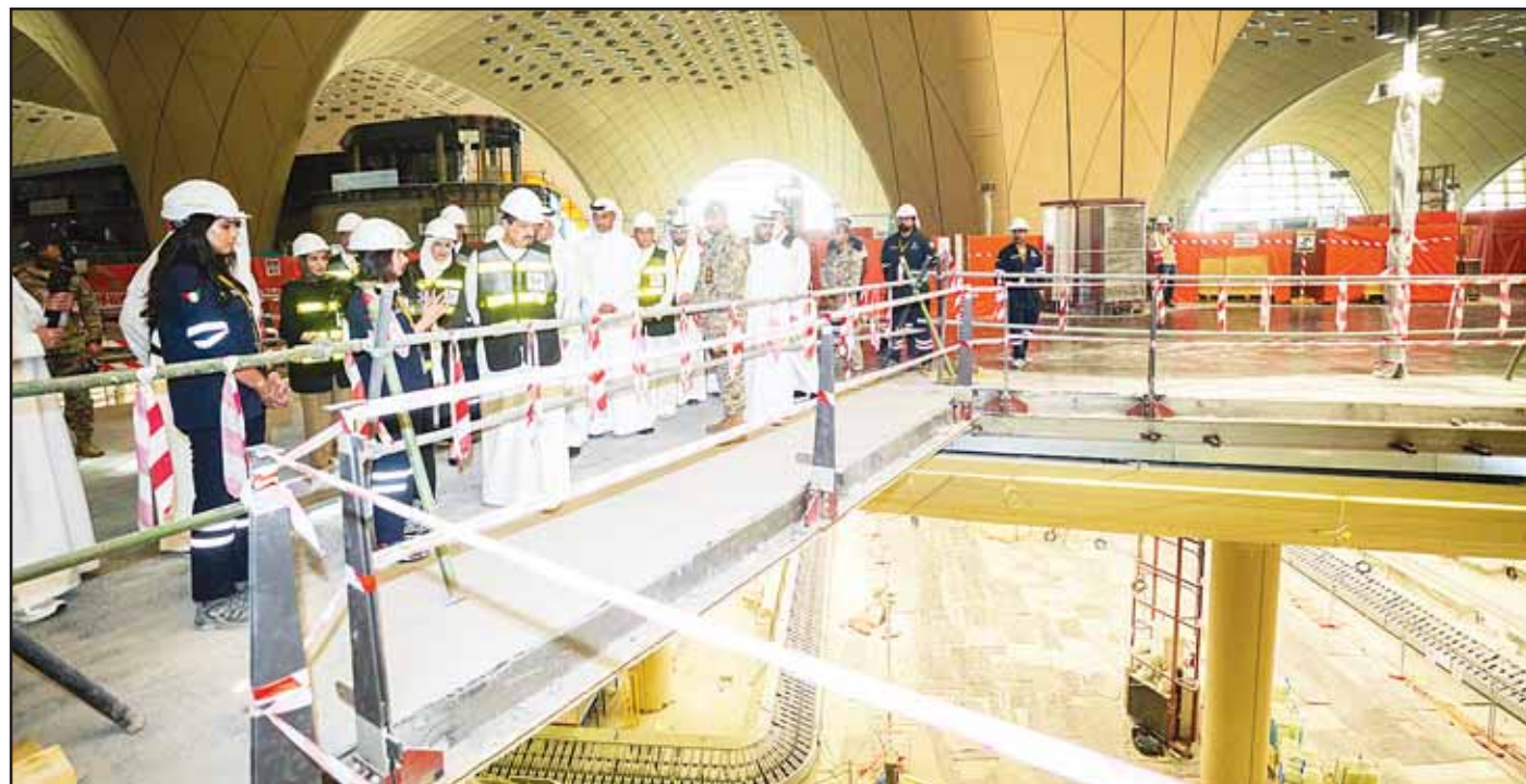
PM Diwan photo

Global scenario, wars push up inflation rates