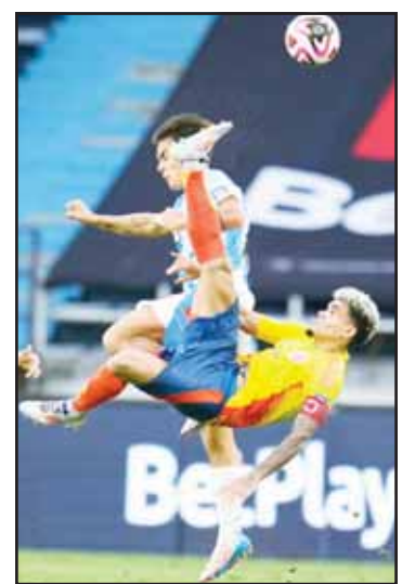
Colombia's Luis Diaz, right, and Argentina's Paulo Dybala battle for the ball during a qualifying soccer match for the FIFA World Cup 2026 at the Metropolitano Roberto Melendez stadium in Barranquilla, Colombia.

The latest figures included costs of 47.8 million pounds ($62.4 million) primarily related to Ratcliffe's investment.