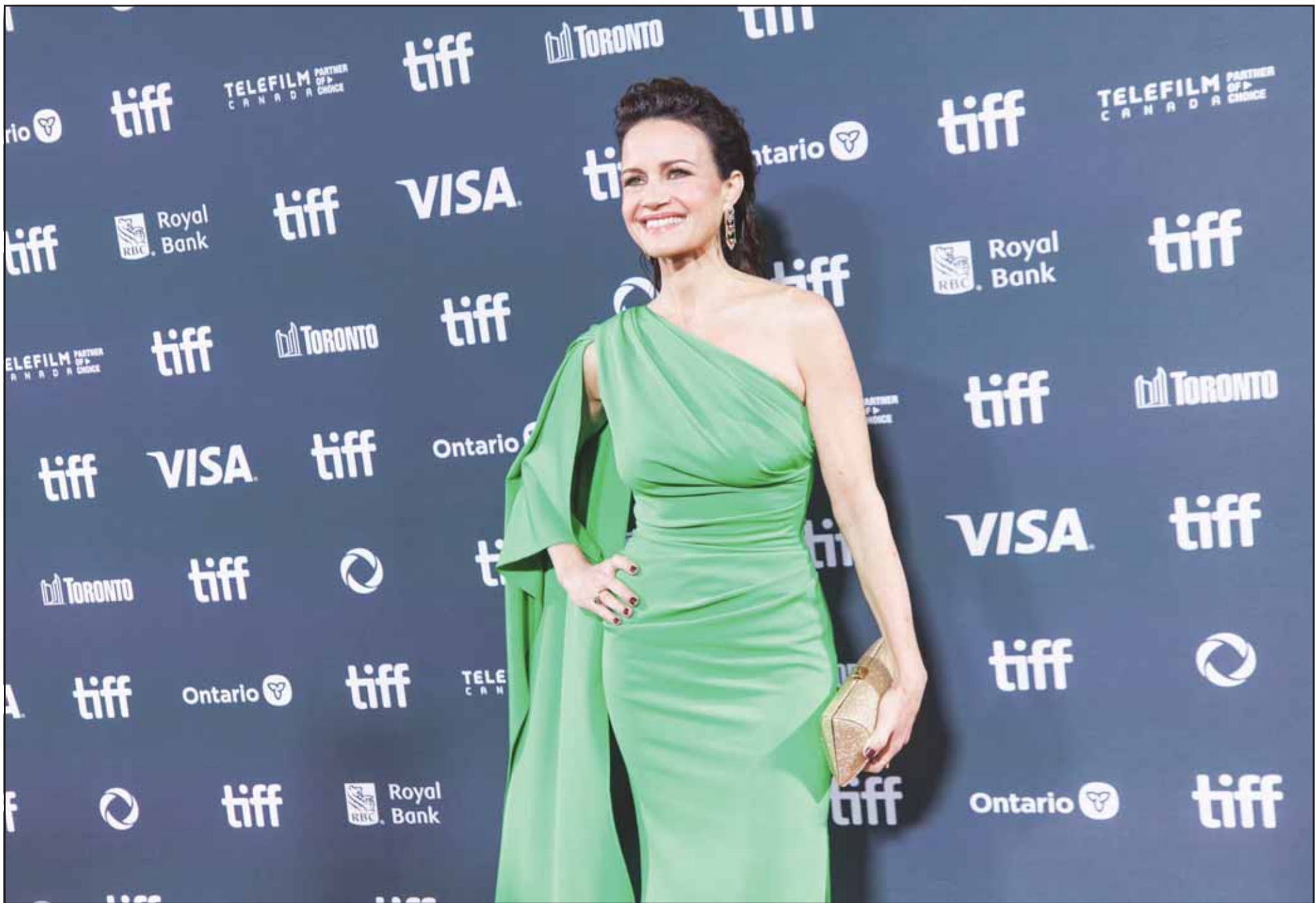
Carla Gugino arrives on the red carpet for the film 'The Friend' at the Roy Thomson Hall during the Toronto International Film Festival, in Toronto, on Tuesday, Sept. 10.