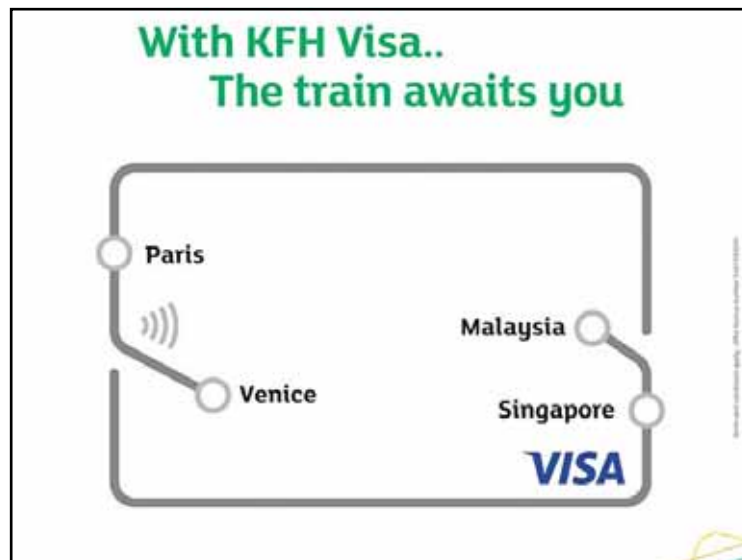
KFH Visa cardholders win luxurious Belmond train trips.

Today, KIB has taken concrete steps in implementing its new strategic objectives. The Bank has cemented its role as a key player in the local banking industry and has continued to maintain its strong financial performance; enabling it to be globally recognized for its strong credit rating and financial position.