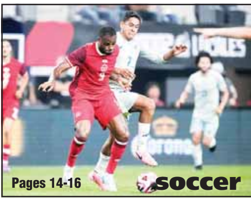
Pages 14-16 SOCCER