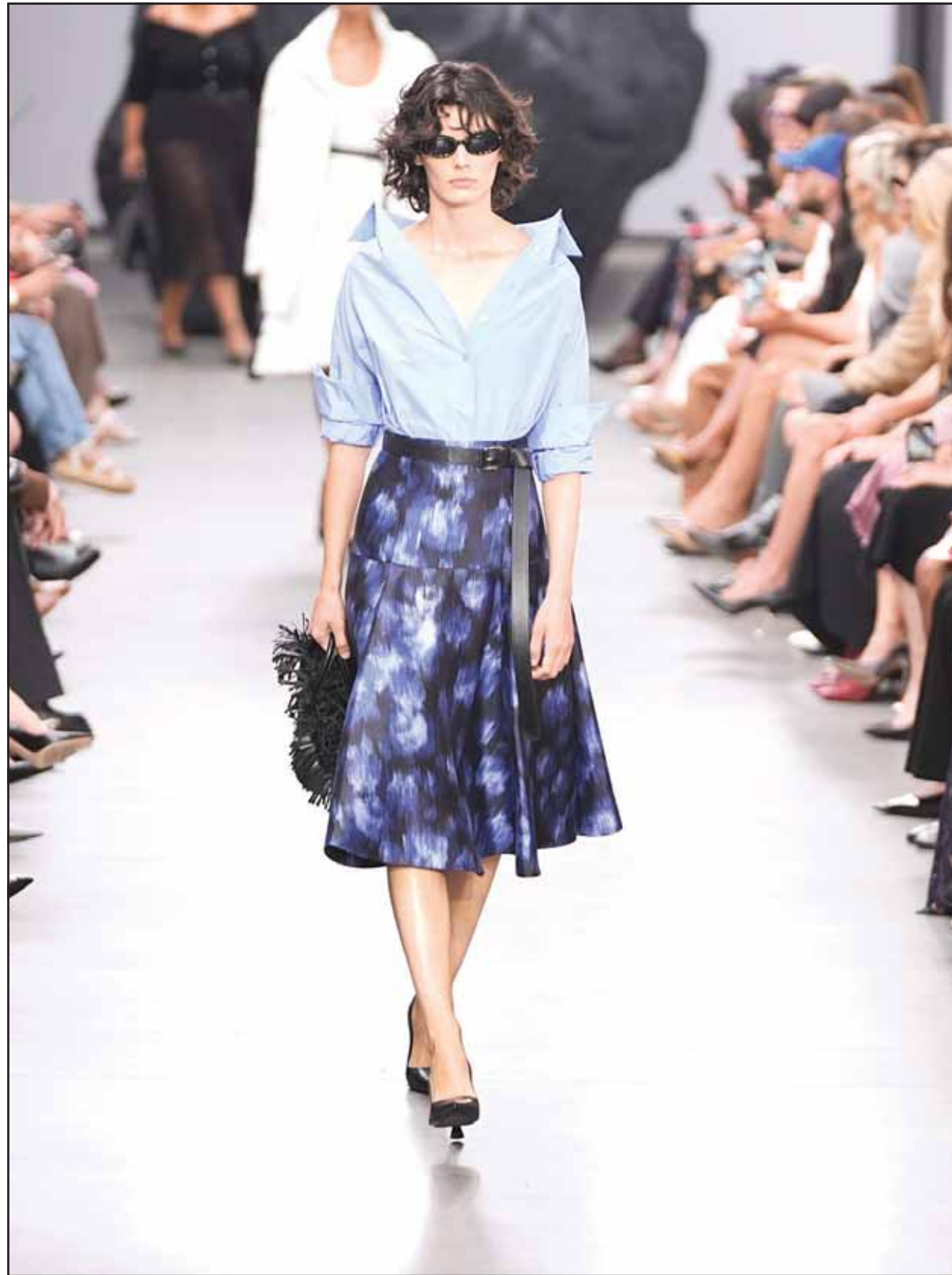
A model walks the runway during the Michael Kors Collection spring/summer 2025 fashion show as part of New York Fashion Week, Tuesday, Sept. 10, in New York.