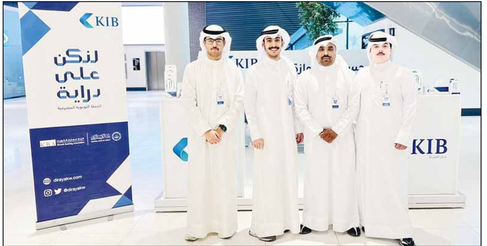
KIB's Warehouse Booth Sept 2024.

About KIB Kuwait International Bank (KIB) is a bank that operates according to the