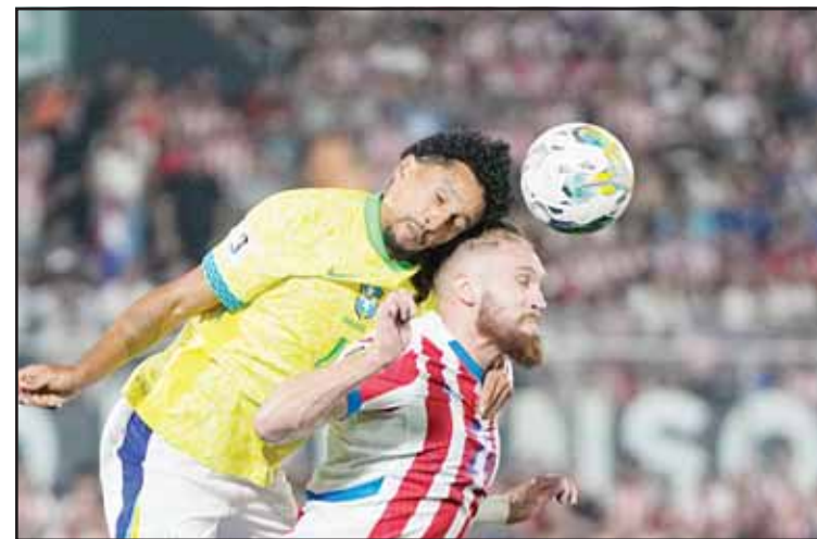
Paraguay's Isidro Pitta, right, and Brazil's Marquinhos go for a header during a qualifying soccer match for the FIFA World Cup 2026 at the Defensores del Chaco Stadium, in Asuncion, Paraguay.