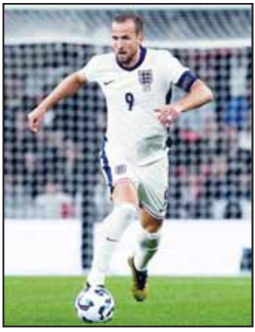
England's Harry Kane is in action during the Group F UEFA Nations League soccer match between England and Finland at Wembley Stadium in London.

LONDON, Sept 11, Harry Kane marked his 100th game for England with two goals and celebrations with his family in a 2-0 win over Finland in the UEFA Nations League.