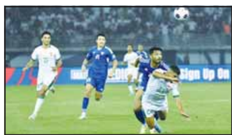
Players challenge for the ball during the qualifying match between Kuwait and Iraq.