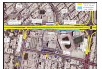
Road map of the Second Ring Road on Cairo street.