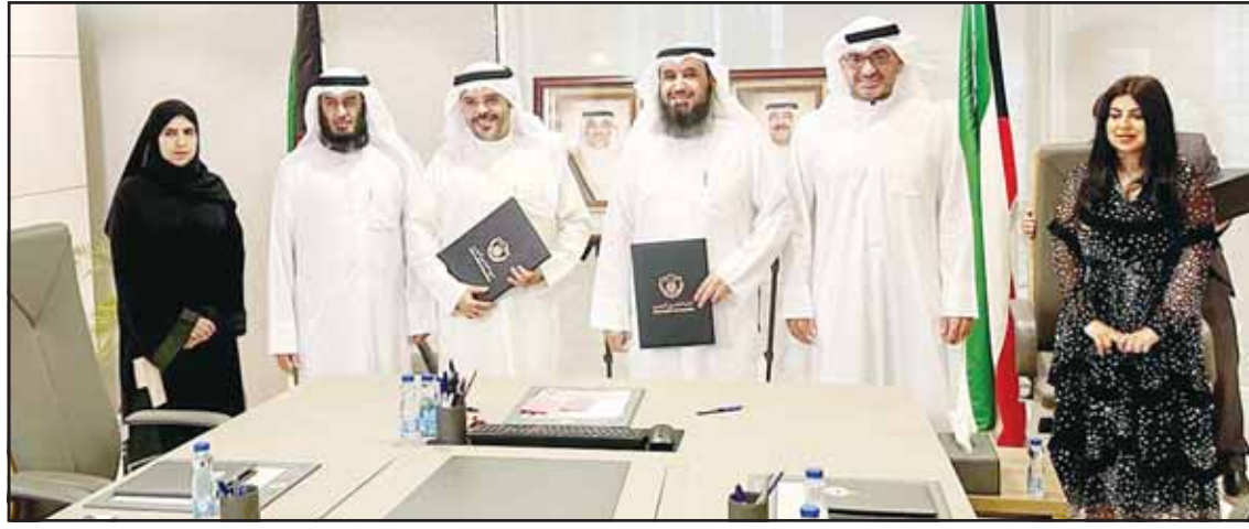
Group photo during the signing of the memorandum of understanding.