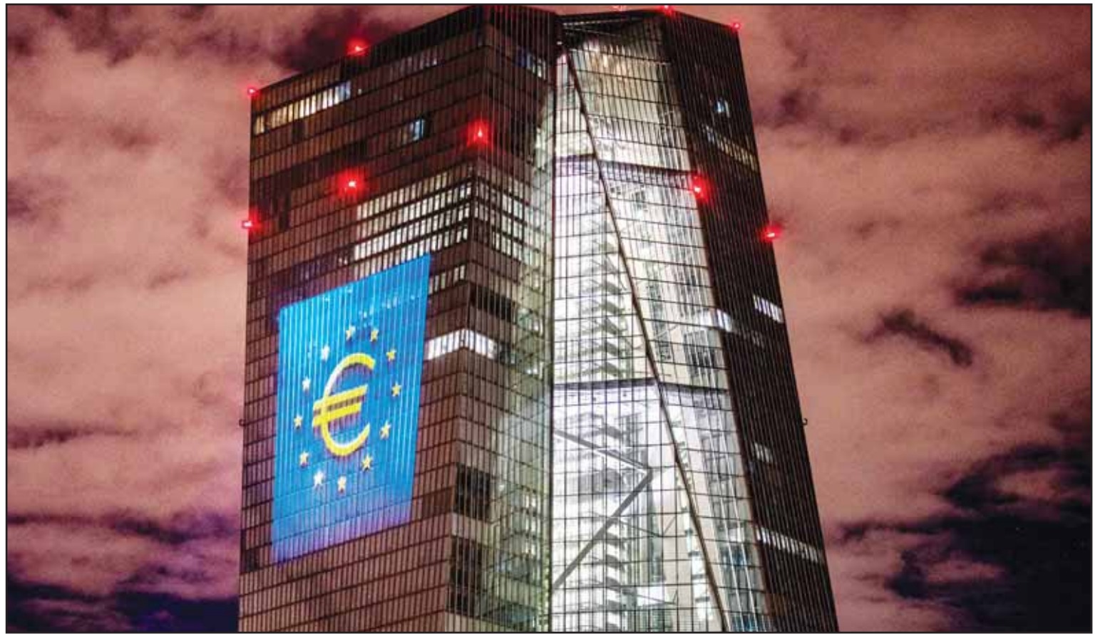
A light installation is projected onto the building of the European Central Bank during a rehearsal in Frankfurt, Germany, Thursday, Dec. 30, 2021.