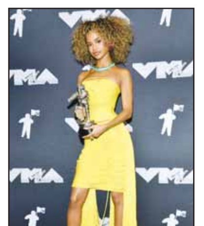
Tyla poses with award for best afrobeats for 'Water.'