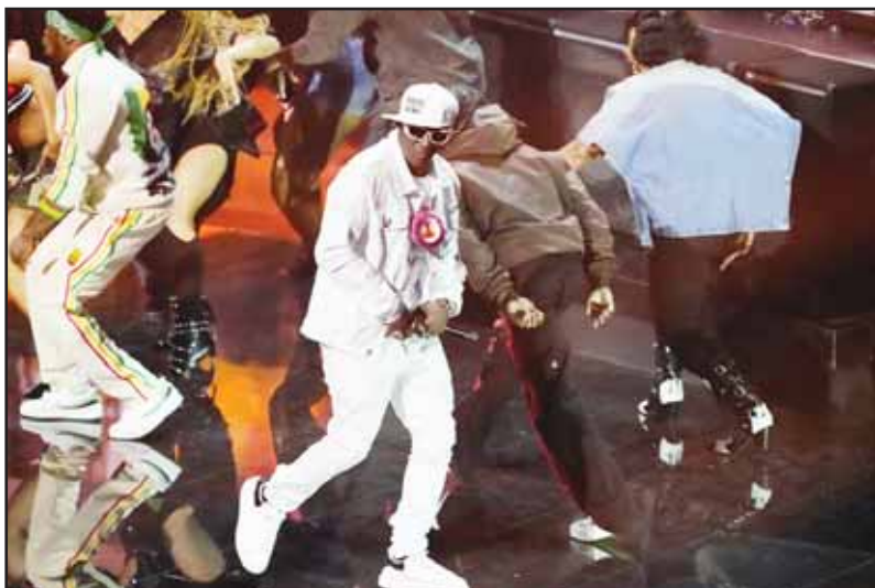
Flavor Flav performs during the MTV Video Music Awards.