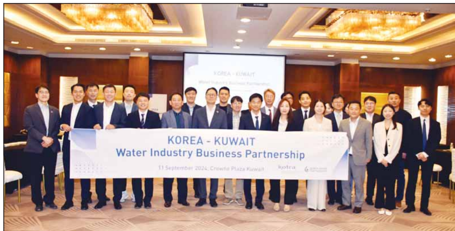
Photos during the event.