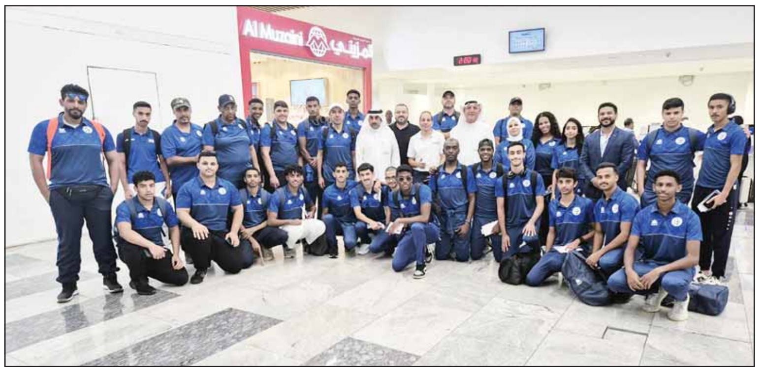
The Kuwait athletics delegation.

Atletico was very lucky to win in Bilbao before the break, but will fancy its chances against a rival that has only one point from four games and who are without the injured Hugo Duro. Rafa Mir's arrest for alleged sexual assault has kept Valencia in the headlines for the wrong reasons during the break and the big forward will take no part in Sunday's match.