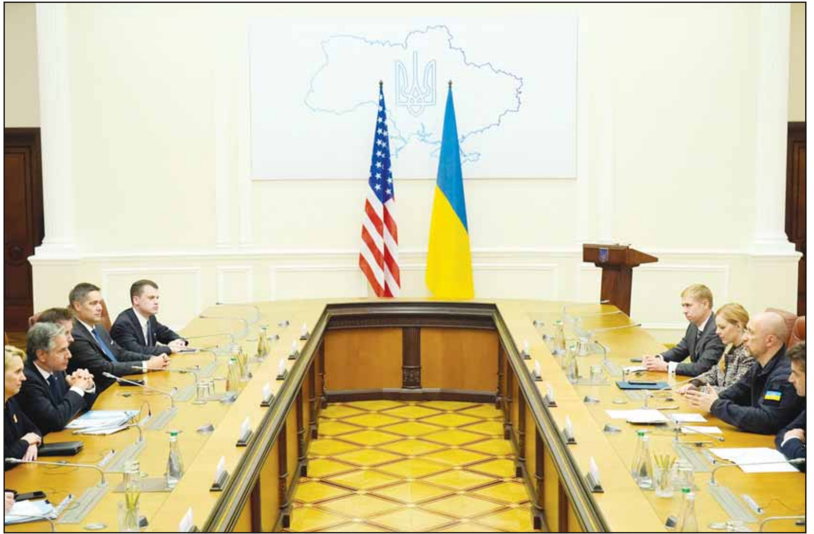
US Secretary of State Antony Blinken, (second left), meets with Ukraine's Prime Minister Denys Shmyhal, second right, at the Cabinet of Ministers in Kyiv, Ukraine, on Sept. 11.

Berisha went on Wednesday to the special prosecutors' office, known as the Special Structure Against and Organized Crime, where he was told the charges against him for about half an hour. He said he was called as a defendant and was handed a file of evidence, some 500 pages long, that he called "lies."