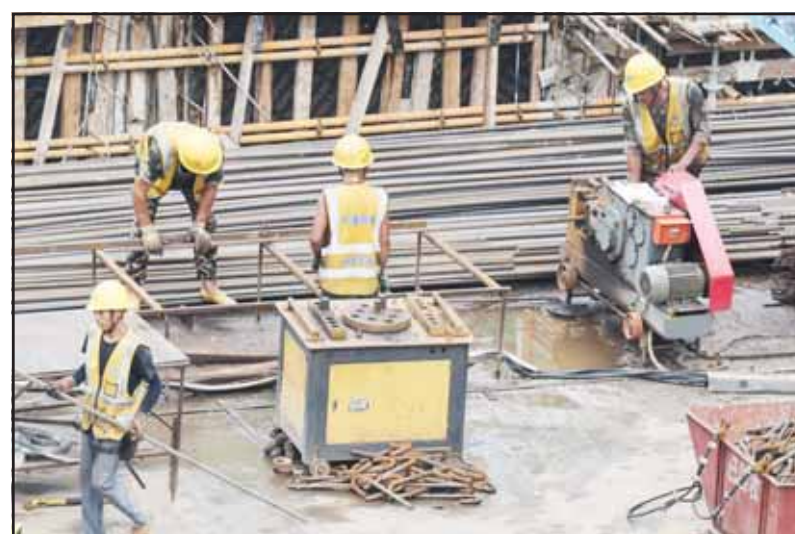
Workers work at a construction site in Haikou, south China's Hainan Province on Sept 11. Hainan has witnessed its production gradually resumed after Super Typhoon Yagi, the 11th typhoon of the year, made landfall in Hainan on Friday and brought damage across the island.

tion Authority, or ANIE, published figures throughout election day showing a low turnout. By 5 pm on Saturday, the reported turnout in Algeria was 26.5% - far fewer than had voted by that time in the election five years ago. After unexplained delays, it said