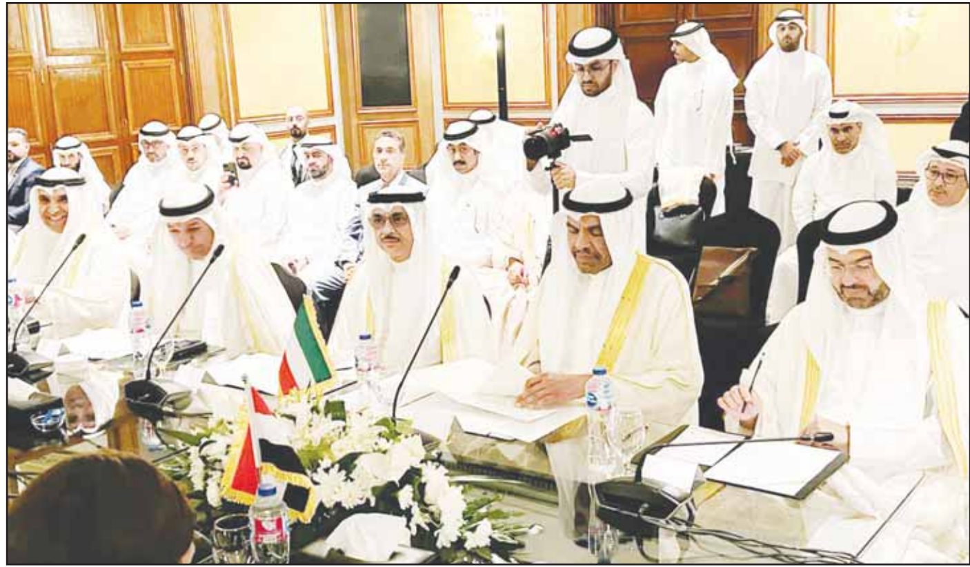
Kuwaiti Foreign Minister Abdullah Al-Yahya and his accompanying delegation attend the meeting.

Private sector must chip in, say shocked citizens