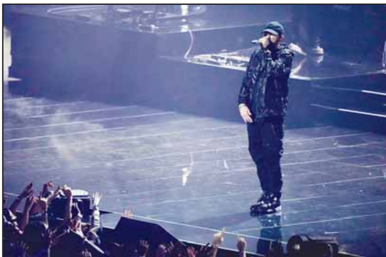
Eminem performs 'Somebody Save Me' during the MTV VMAs.