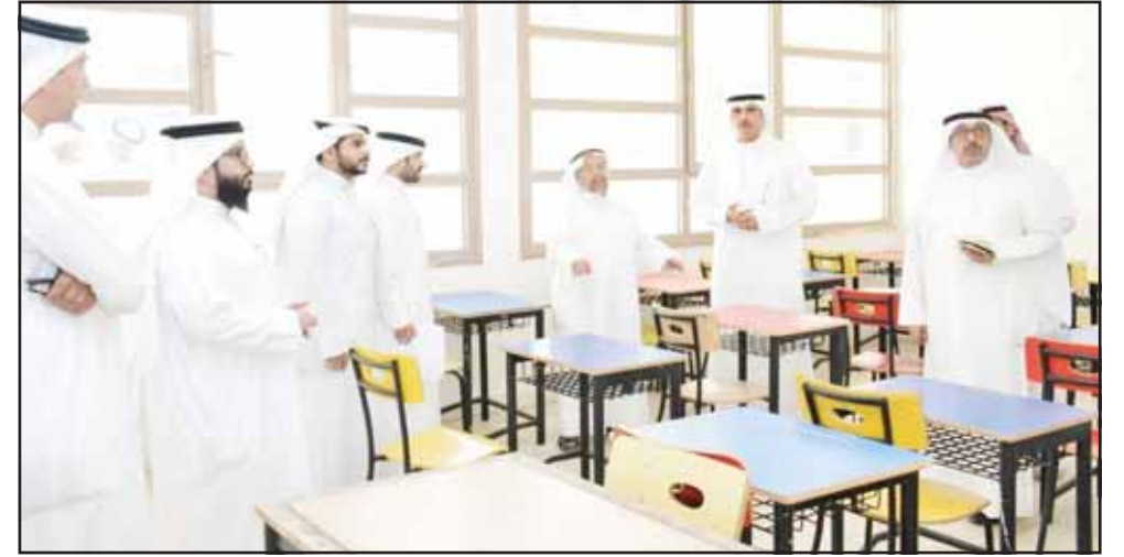
Ahmadi Governor Sheikh Hamoud Jaber Al-Ahmad Al-Sabah during inspection tour across various schools to assess their readiness for the new academic year.

These efforts are complemented by increased coordination with the Kuwait Supply Company and cooperative societies to address supply discrepancies, aimed at enhancing the efficiency of Kuwait's supply system.