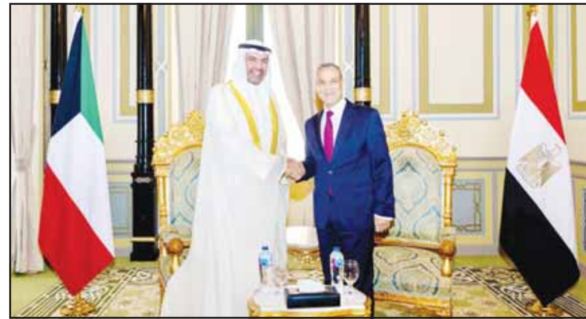
KUWAIT CITY, Sept 12: Kuwait FM meets with his Egyptian counterpart on the sidelines of the 13th session of the Kuwaiti-Egyptian Joint Higher Committee.

This extension follows the expiry of the previous term for these positions. The resolution ensures continuity in the management of medical departments until new appointments are made.