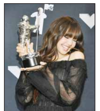
LISA poses with award for best K-Pop for 'Rockstar.'