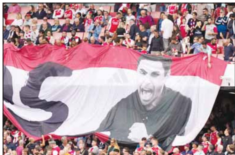
Fans show a banner with photo of Arsenal's manager Mikel Arteta, reading in Spanish 'Let's go' during the English Premier League soccer match between Arsenal and Brighton, at Emirates Stadium in London.

Four groups of teams are playing in four cities this week to qualify for the eight-team Finals in Malaga, Spain, in November. The top two countries in each four-team group advance.