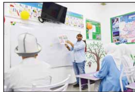
Right: A member of the magazine team reads the stories to the students. (Left) School bags being given to young children.