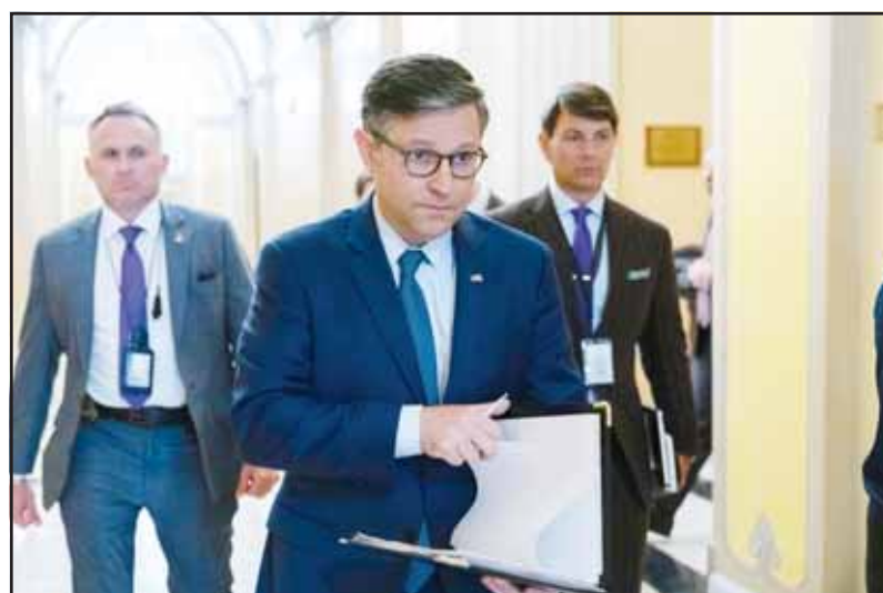
US Speaker of the House Mike Johnson, R-La., walks to a meeting at the Capitol in Washington on Sept. 11. Johnson postponed a vote Wednesday on a temporary spending bill that would keep federal agencies and programs funded for six months as opposition from both parties thwarted his first attempt at avoiding a partial government shutdown in three weeks.

The explosion happened Tuesday evening at a small trailer selling various types of