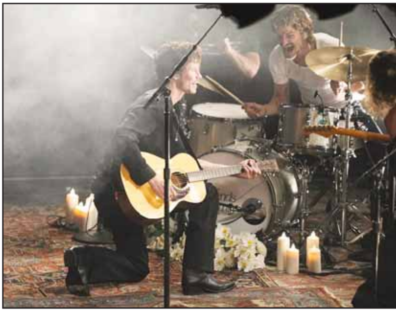
Shawn Mendes performs 'Nobody Knows' during the MTV Video Music Awards.