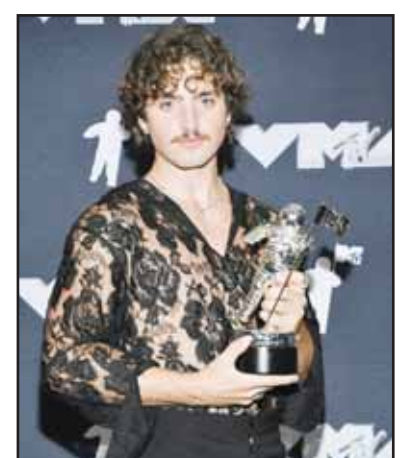
Benson Boone with award for best alternative for 'Beautiful Things.'