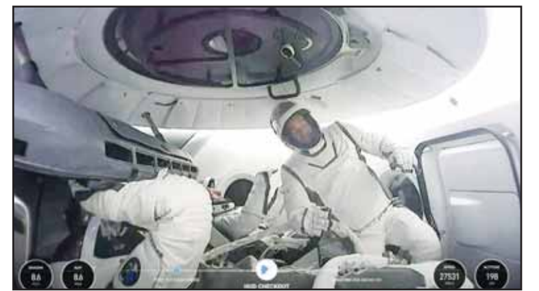
This image made from a SpaceX video shows the crew of the first private spacewalk led by tech billionaire Jared Isaacman inside the capsule, Thursday Sept. 12.

This operation was planned down to the minute with little room for error. Trying out new