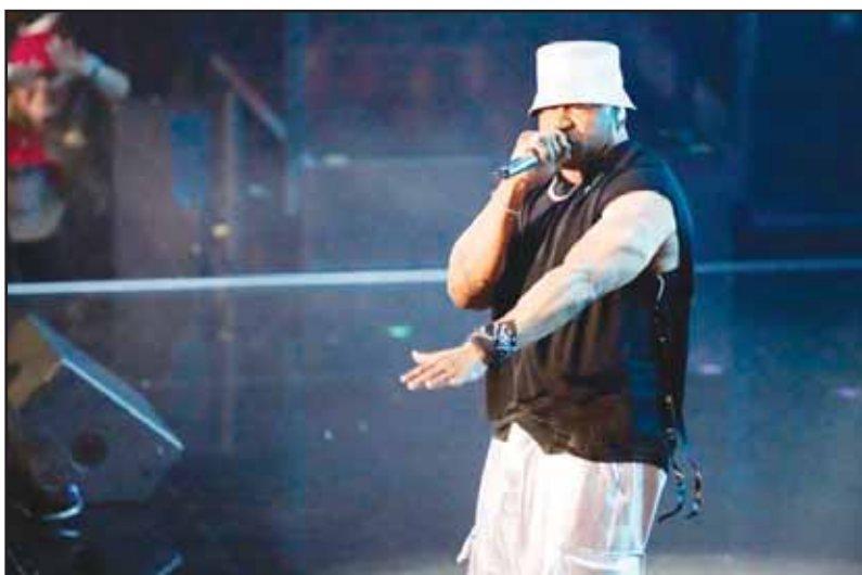
LL Cool J performs during the MTV Video Music Awards.