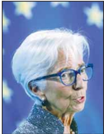
The President of European Central Bank, Christine Lagarde, speaks during a press conference in Frankfurt, Germany, Thursday, Sept. 12, 2024.

Policy makers must keep an eye on simmering inflation among services companies and rising wages as workers push to make up for purchasing power lost to the outburst of inflation that followed the end of the pandemic.