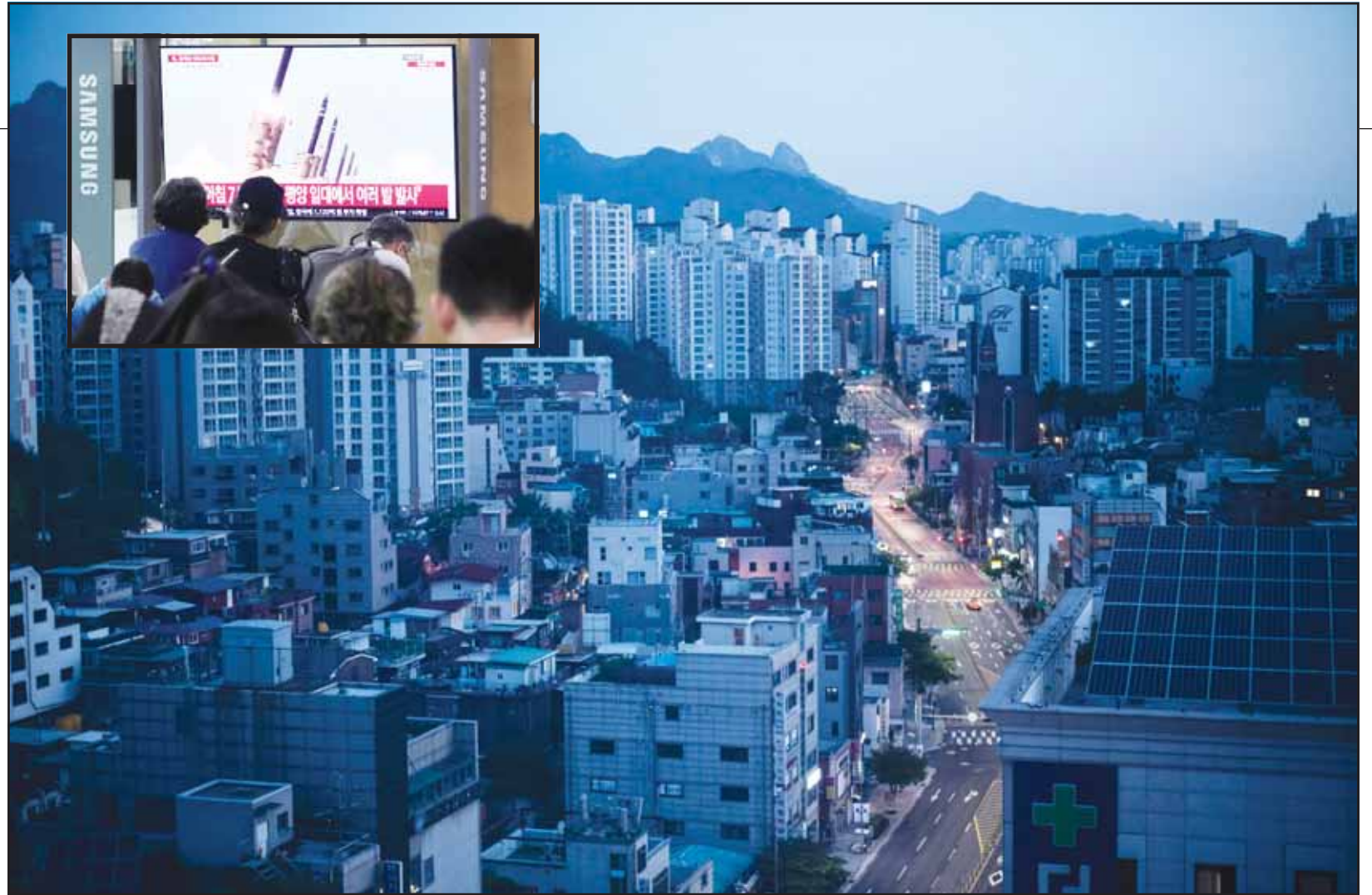
Cars drive along quiet roads at dawn in Seoul with Bukhan Mountain in the distance on May 17. Inset: A TV screen shows a file image of North Korea's missiles launch during a news program at Seoul Railway Station in Seoul, South Korea on Sept 12.