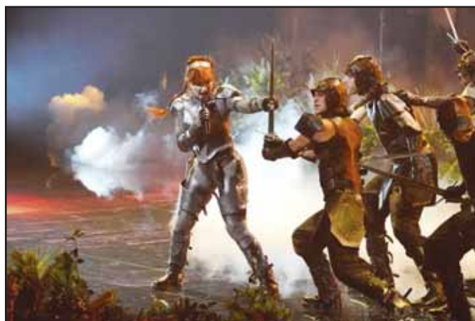
Chappell Roan performs 'Good Luck, Babe' during the MTV Video Music Awards on Sept 11.