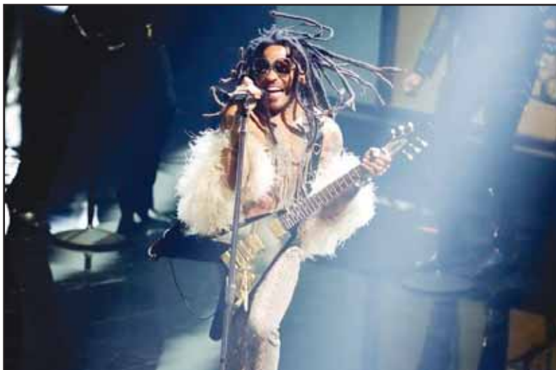
Lenny Kravitz performs during the MTV Video Music Awards.