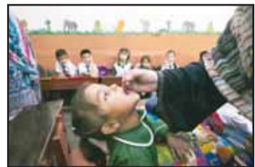
A health worker administers a polio vaccine to a child at a school in Peshawar, Pakistan, Monday, Sept. 9.

Locals told the media the patients who died from the mysterious disease