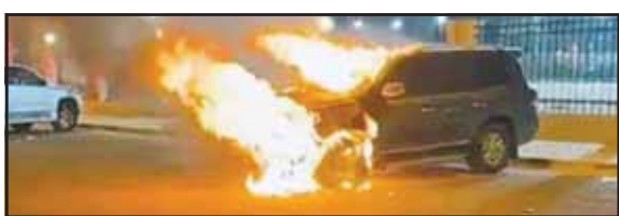
The vehicle going up in flames.

He also emphasized the need to activate the Civil Notary Law, as it is an important step in the issuance of decisions in the interest of citizens; affirming the Cabinet's decisions are steps in the right direction, particularly in digitizing services and achieving sustainable development goals.