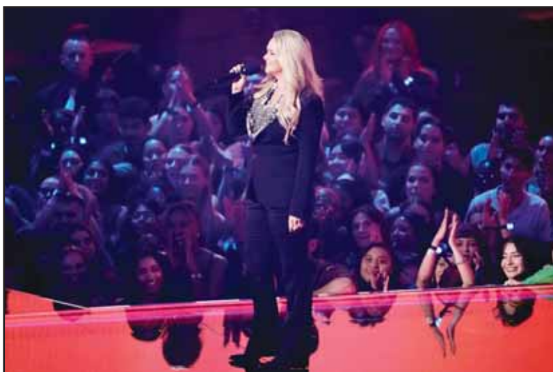
Miranda Lambert presents the award for song of the year during the MTV VMAs.