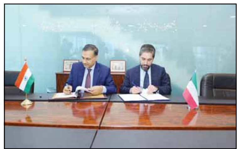
Photos of the signing memorandum of understanding.