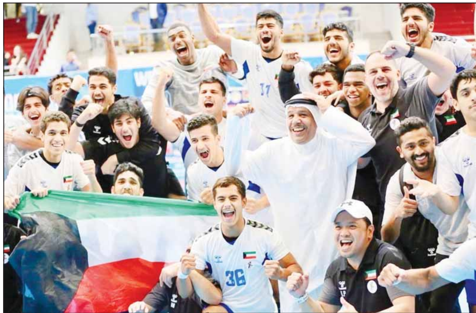
The Kuwaiti players celebrate with officials after beating Japan to qualify for the Junior World Cup.

Minister attributes achievement to ongoing support from political leadership