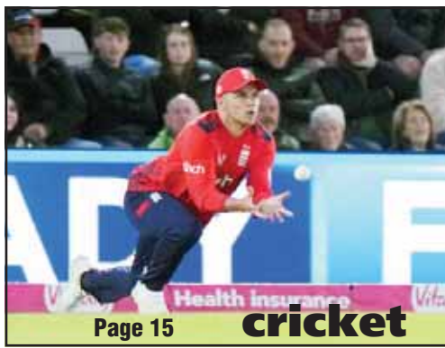
Page 15 cricket