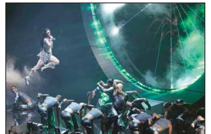
Katy Perry, (far left), performs during the MTV Video Music Awards.