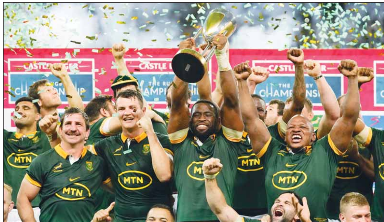
South Africa players celebrate with the trophy after defeating Argentina and winning the rugby championship at Mbombela stadium in Nelspruit, South Africa.

The 45-year-old expressed gratitude for the opportunity to manage one of South America's most successful clubs but admitted he was no longer the best man for the job.