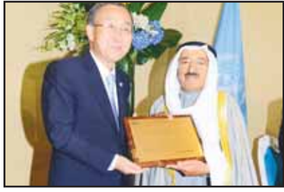
The United Nations honored the late Amir by naming His Highness (Leader of Humanitarian Work) in September 2014.

KUWAIT CITY, Sept 29, (KUNA): Some four years after his death, Kuwaitis on Sunday reminisced about the notable achievements of the late Amir Sheikh Sabah Al-Ahmad Al-Jaber Al-Sabah, which helped propel the nation to the upper echelons of the international community.