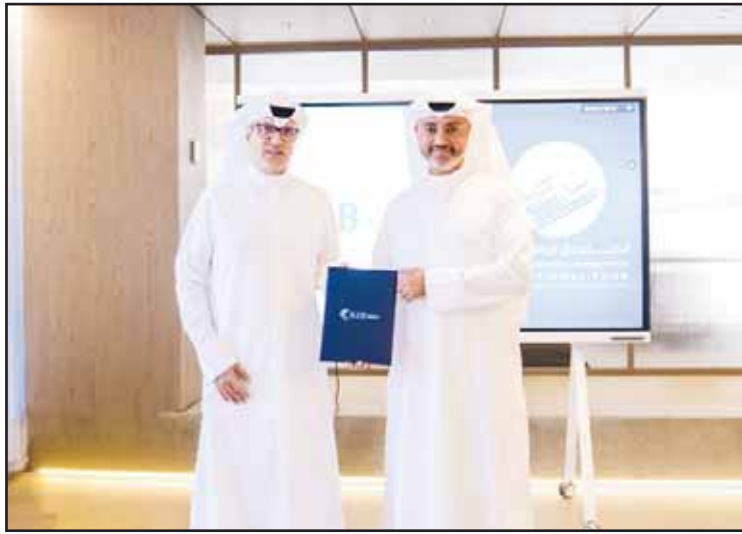
KIB Mubader agreement with National Fund.

KUWAIT CITY, Sept 29: Kuwait International Bank (KIB) announced that its business incubator KIB Mubader Center has signed a memorandum of understanding and cooperation with the National Fund for Small and Medium Enterprise Development. The agreement aims to enhance collaboration and exchange expertise between the two parties to support the entrepreneurship sector in Kuwait.