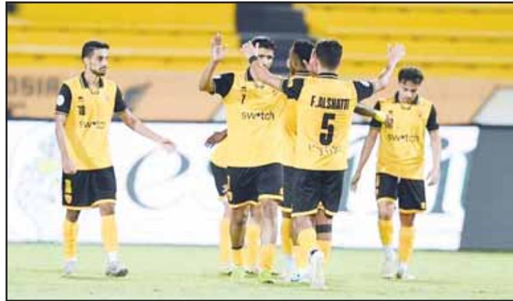
Al-Qadsiya players celebrate their win over Al-Tadamon.

He characterized the win over Al-Tadamon as "not easy," especially given the challenges Al-Qadsiya faced in recent matches. Petrovic also called for increased public support in the up-