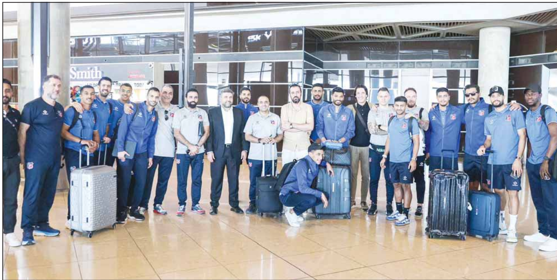
Kuwait Club players and officials pose for a group photo upon their arrival in Jordan for AFC Champions League 2 match against Irbid.

Elsewhere, Jonathan David scored a hat trick as 2021 champion Lille won at Le Havre 3-0.