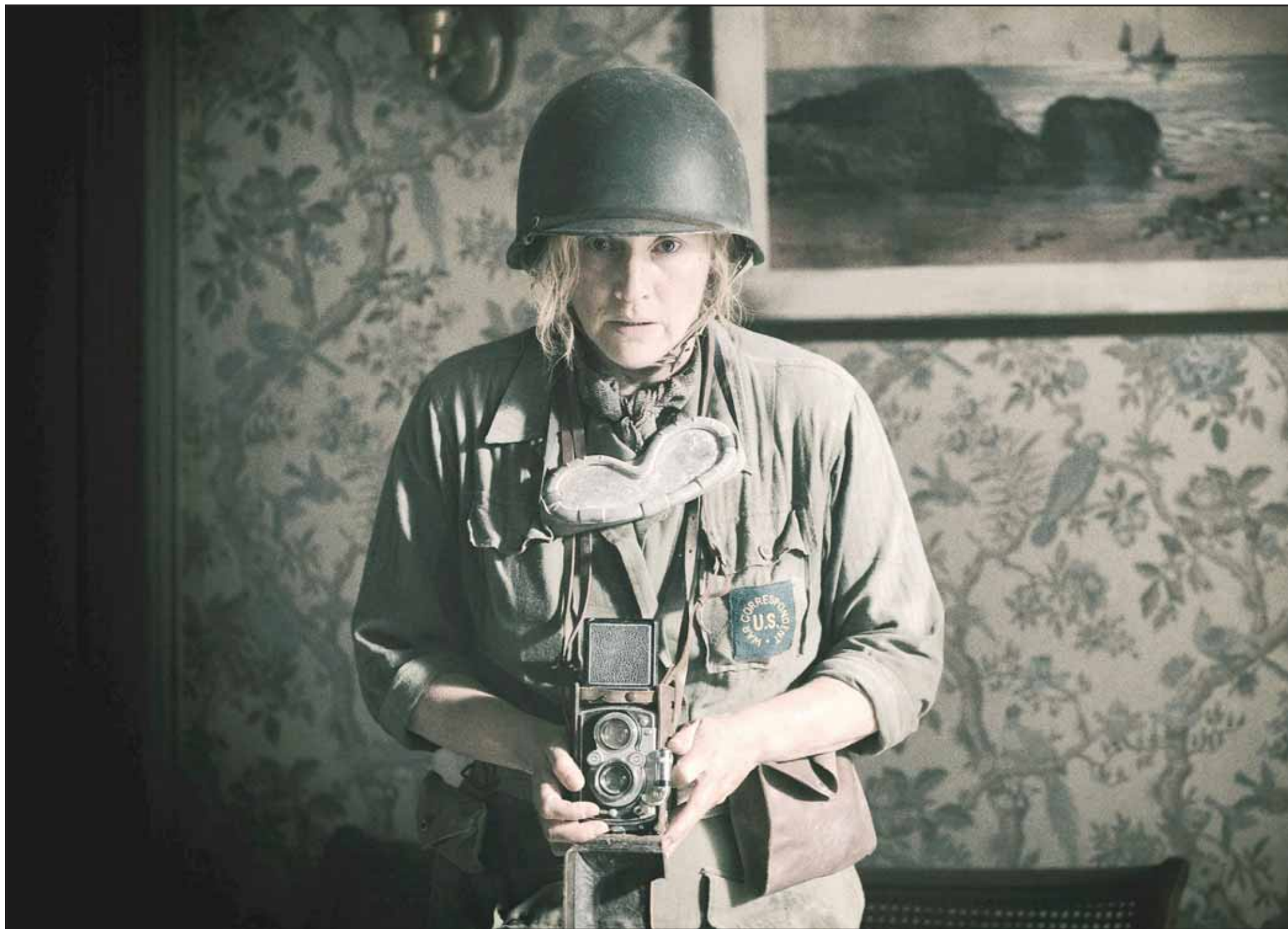
This image released by Roadside Attractions shows Kate Winslet in a scene from the film 'Lee.' (AP)