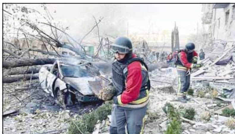
In this photo provided by the Ukrainian Emergency Service, emergency workers clear the rubble after Russia attacked the city with guided bombs overnight in Zaporizhzhia, Ukraine on Sept. 29, 2024. (AP)

Cobb County Police Chief Stuart Van-Hoozer said a large number of his officers arrived to support Smyrna police because