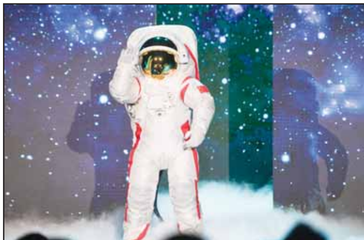
This photo shows the exterior design of China's moon-landing spacesuit during the third Spacesuit Technology Forum in southwest China's Chongqing Municipality, Sept. 28.

Hague noted before the flight that change is the one constant in human spaceflight. "There's always something that is changing. Maybe this time it's been a