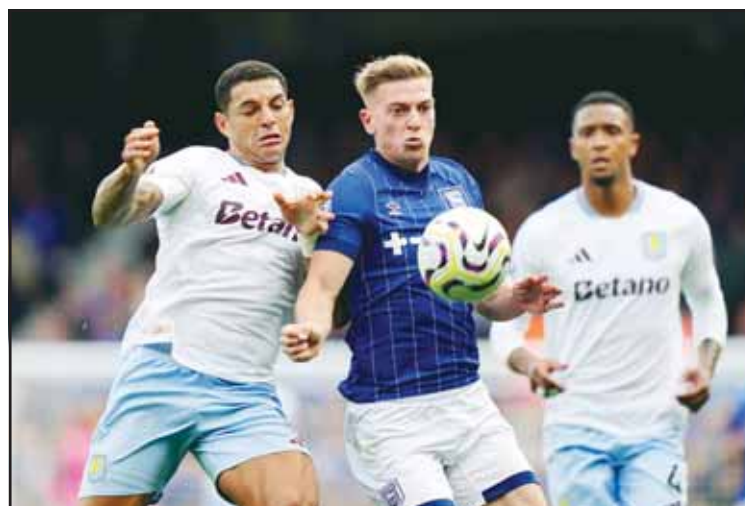
Aston Villa's Diego Carlos (left) and Ipswich Town's Liam Delap battle for the ball during the British Premier League soccer match between Ipswich Town and Aston Villa at Portman Road, Ipswich, England.

front in the 32nd when rising to meet Leon Bailey's cross from the right for his fourth goal in as many games.