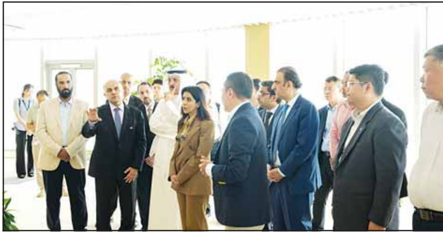
Minister Al-Mashaan and her delegation during their visit at Yangshan Port near Shanghai.