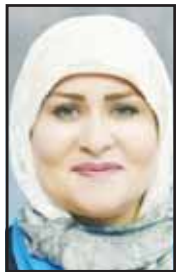
Sheikha Tamadur Al-Sabah