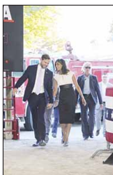
US Republican vice presidential nominee Sen JD Vance, R-Ohio, arrives with his wife Usha Chilukuri Vance for a campaign event on Sept 25 in Traverse City, Mich.

From there, it quickly moved through Georgia, where Gov. Brian Kemp said Saturday that it "looks like a bomb went off" after viewing splintered homes and debris-covered highways from the air. Weakened, Helene then soaked the Carolinas and Tennessee with torrential rains, sending creeks and rivers over their banks and straining dams.