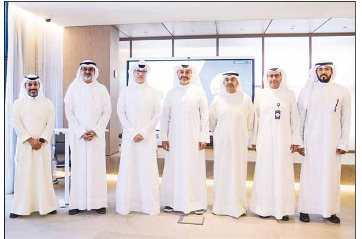
KIB Mubader signs agreement with National Fund for Small and Medium Enterprise Development.

projects. The Center views these partnerships as a crucial foundation for progressing toward a more prosperous future. The Bank also recognizes the importance of activating such agreements through KIB Mubader Center, which helps achieve the desired goals and enhances the private sector's contribution to the national economy.