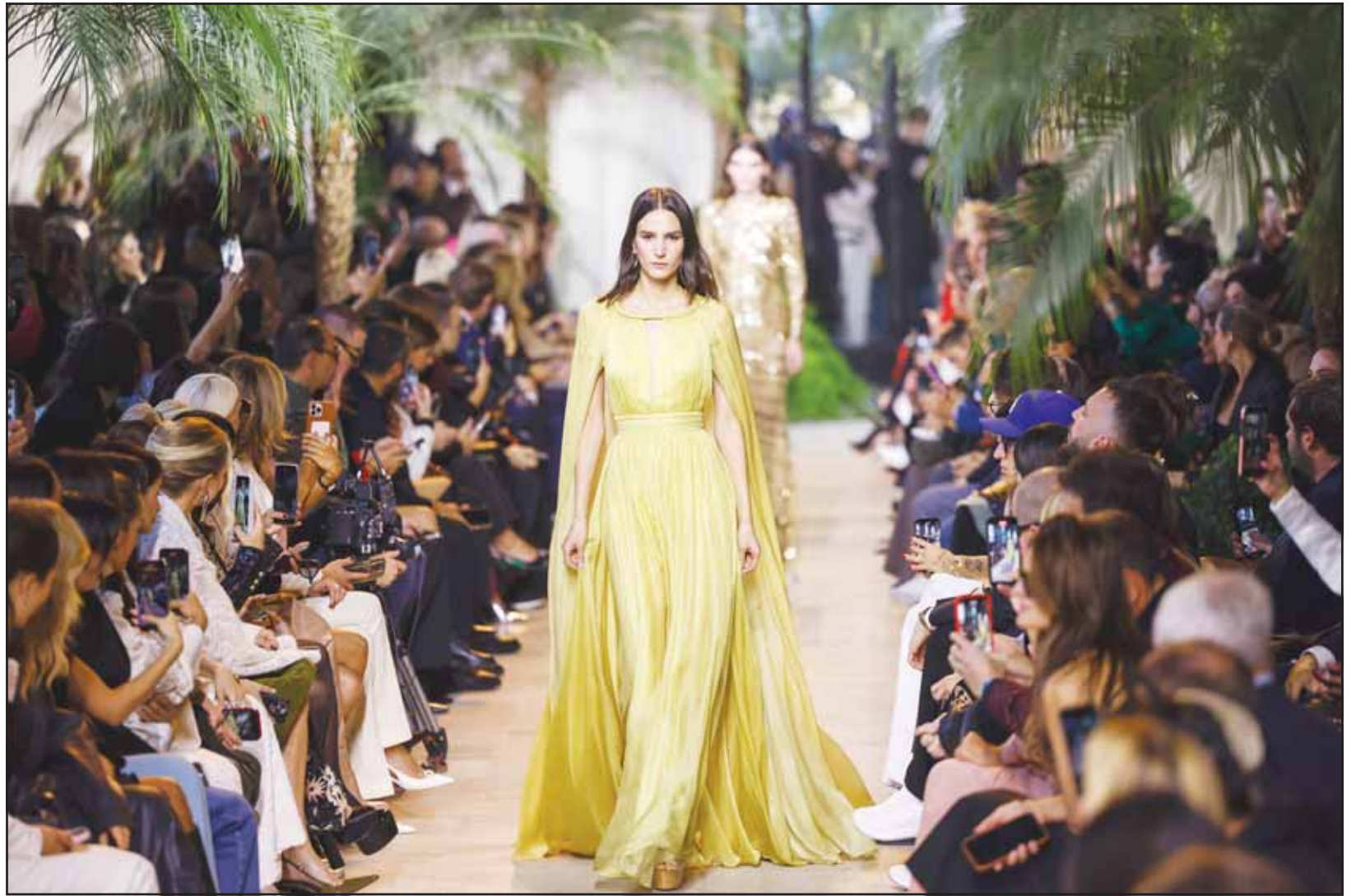
A model wears a creation as part of the Elie Saab Spring/Summer 2025 collection presented Saturday, Sept. 28, in Paris.