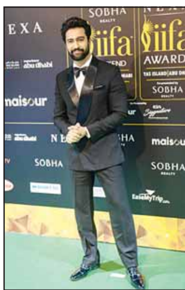
Bollywood actor Vicky Kaushal poses on the green carpet ahead of the 24th International Indian Film Academy (IIFA) awards in Abu Dhabi, United Arab Emirates, Saturday, Sept. 28.