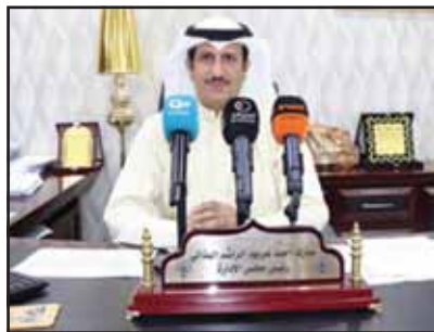
Al-Arabout during the conference.

Furthermore, he pointed out that requests for cashiers, salesmen, and drivers have gone unanswered, despite explicit instructions from the Minister and Undersecretary of the Cooperative Sector aimed at streamlining procedures with the Administrative