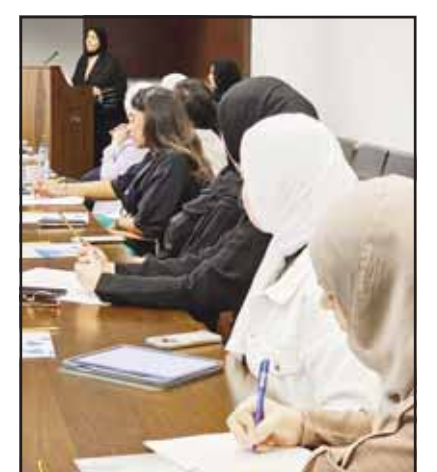
Photo taken during the meeting.

She highlighted the necessity of understanding their attendance requirements, whether they would be attending full-time