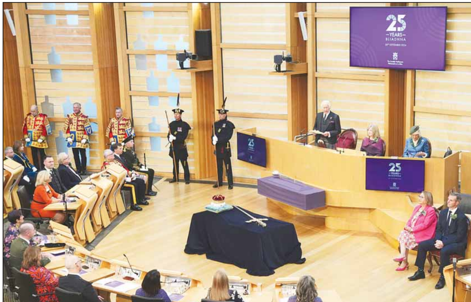
Britain's King Charles III, (center right), gives a speech in the Debating Chamber, during the 25th Anniversary celebrations of the Scottish Parliament at Holyrood in Edinburgh on Sept 28.

The prime minister will outline his priorities in a general policy speech scheduled for Tuesday at the National Assembly.