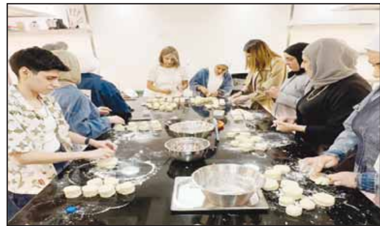
US Embassy hosts Master Class.

Participants learn innovative techniques