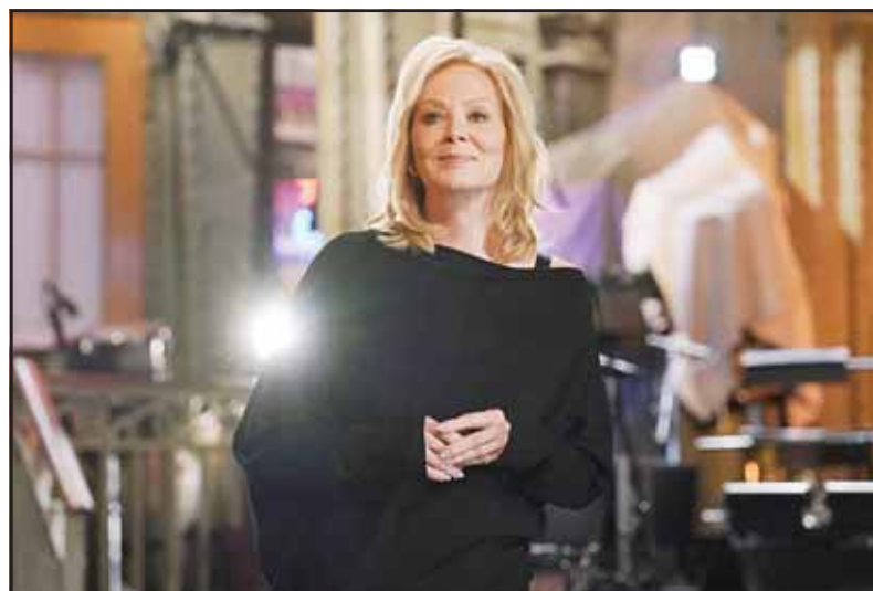
This image released by NBC shows Jean Smart during promos for 'Saturday Night Live' on Tuesday, Sept. 24, at Studio 8H in New York.