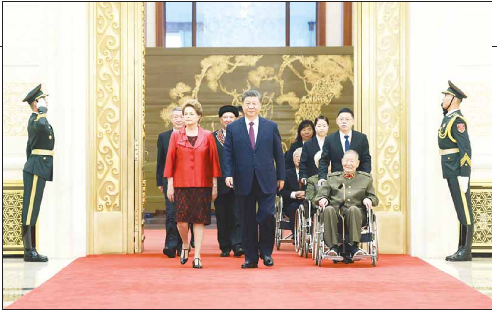
Chinese President Xi Jinping walks into the venue of the presentation ceremony of the national medals and honorary titles of the People's Republic of China with the recipients at the Great Hall of the People in Beijing, capital of China on Sept 29.

According to UN estimates, El Fasher is home to about 1.5 million people, 800,000 of whom are internally displaced persons.