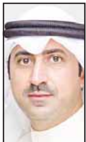
Sheikh Nimr Al-Sabah

In conclusion, KPMG Economics argued that any rise in oil prices could be fleeting. A global reaction might follow, with oil-producing nations outside the Middle East ramping up production in response to higher prices.