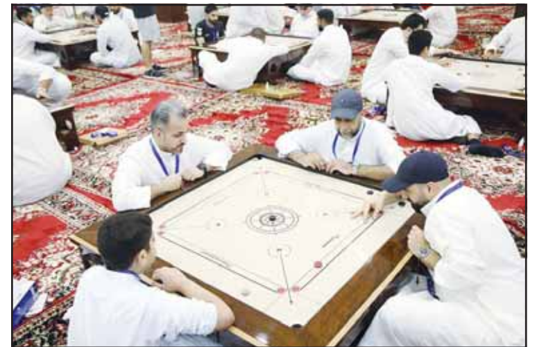
Participants in action.

Malcolm Marx scored from a line-out maul, du Toit crossed for his second try after a Kurt-Lee Arendse break, and Jesse Kriel scored from a Handre Pollard chip.