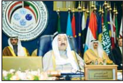
File photo of HH the Amir Sheikh Sabah Al-Ahmad opens the Kuwait International Conference for the Reconstruction of Iraq.