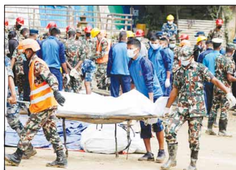
Rescue personnel transport the dead body of a victim who was trapped under a landslide caused by heavy rains in Kathmandu, Nepal on Sept 29. The death toll from flooding and landslides in Nepal has reached at least 129, with dozens of people still missing.