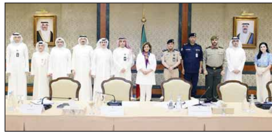
Leaders of academic and educational colleges with officials of the Ministry of Foreign Affairs.

In addition to these pressing matters, the council will review responses from the executive body, ensuring accountability and transparency in their decision-making process. As the session convenes, all eyes will be on the Municipal Council as it embarks on its mission to drive forward Kuwait's urban development.