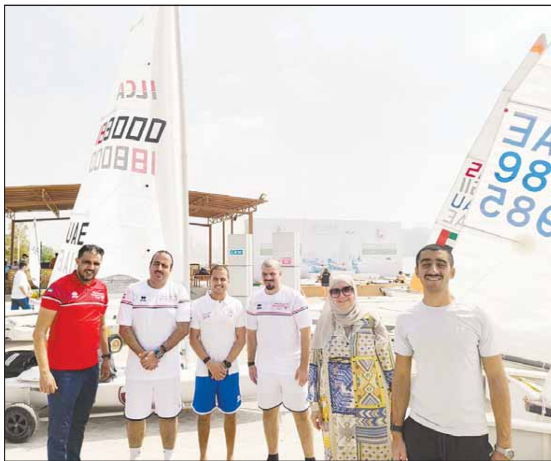
Special Olympics delegation.