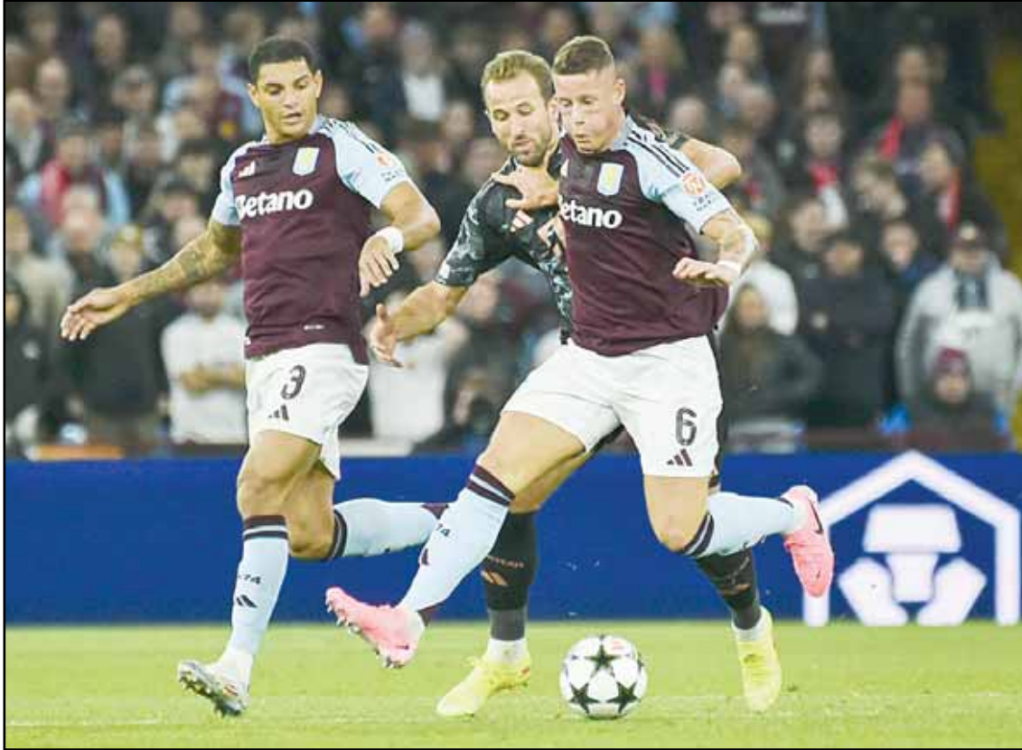
Bayern's Harry Kane, center, duels for the ball with Aston Villa's Ross Barkley, right, and Aston Villa's Diego Carlos during the Champions League opening phase soccer match between Aston Villa and Bayern Munich, at Villa Park in Birmingham, England.

Liverpool cruises as Benfica crushes Atletico in Champions League