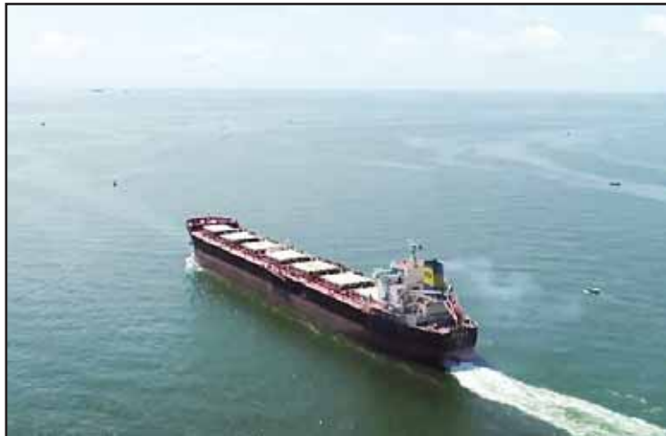
75 years on, China's economy emerges stronger with new growth momentum.