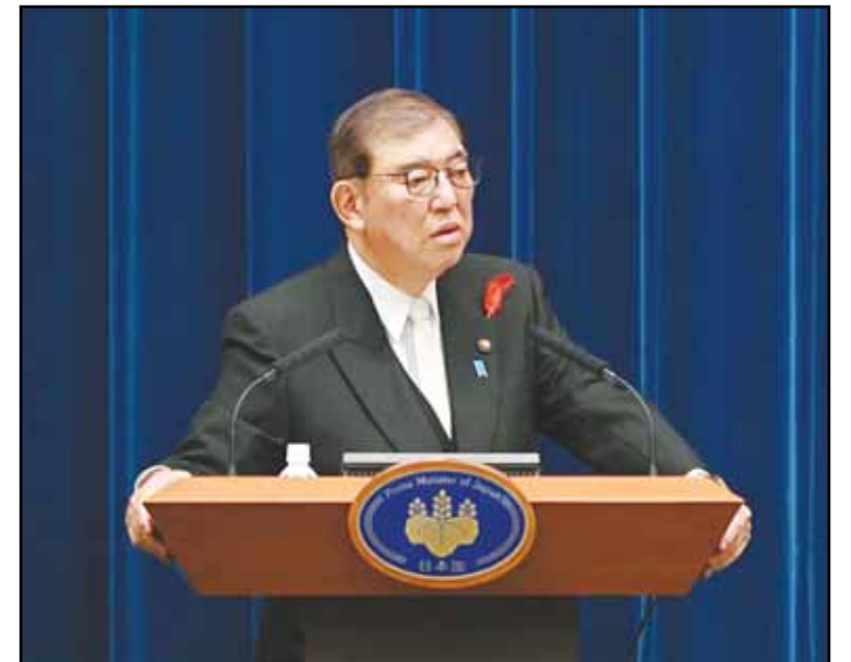
Japan's new Prime Minister Shigeru Ishiba attends a press conference at the prime minister's office in Tokyo, Japan on Oct. 1.

Ishiba also held talks on Wednesday by telephone with South Korean President Yoon Suk Yeol and Australian Prime Minister Anthony Albanese in which they agreed to strengthen cooperation in security and other areas, the Japanese Foreign Ministry said.