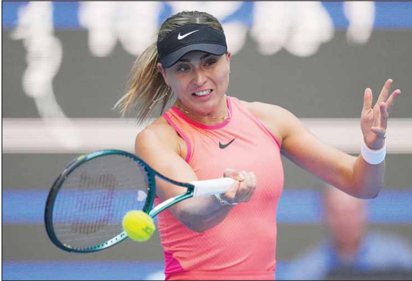
Paula Badosa of Spain returns a shot during the China Open tennis tournament women's singles match against Zhang Shuai of China at the National Tennis Center in Beijing.