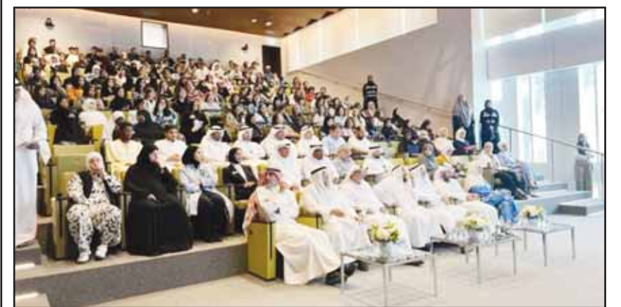
Photo taken during the orientation meeting.

It is noteworthy that Kuwait University has accepted 254 male and female scholarship students into its colleges for the current semester, along with 142 scholarship students admitted to the Language Teaching Center.