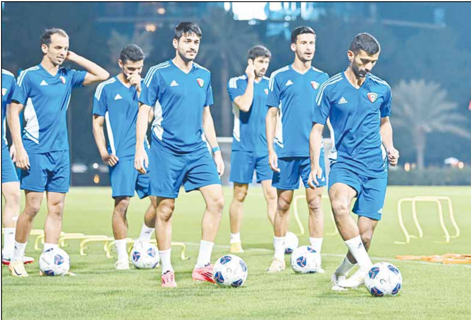
Kuwaiti players preparing for the World Cup qualifier against Oman.

The two teams previously clashed on September 18 in the first group of the 39th Arab Clubs Championship in Kuwait, where Kuwait Club won 31-29. They met again on September 26 in the Arab Championship final, with Kuwait Club securing the title after a 32-23 victory. Now, Al-Salmiya will face the "Sons of Kaifan" once more in the Federation Cup semi-finals.