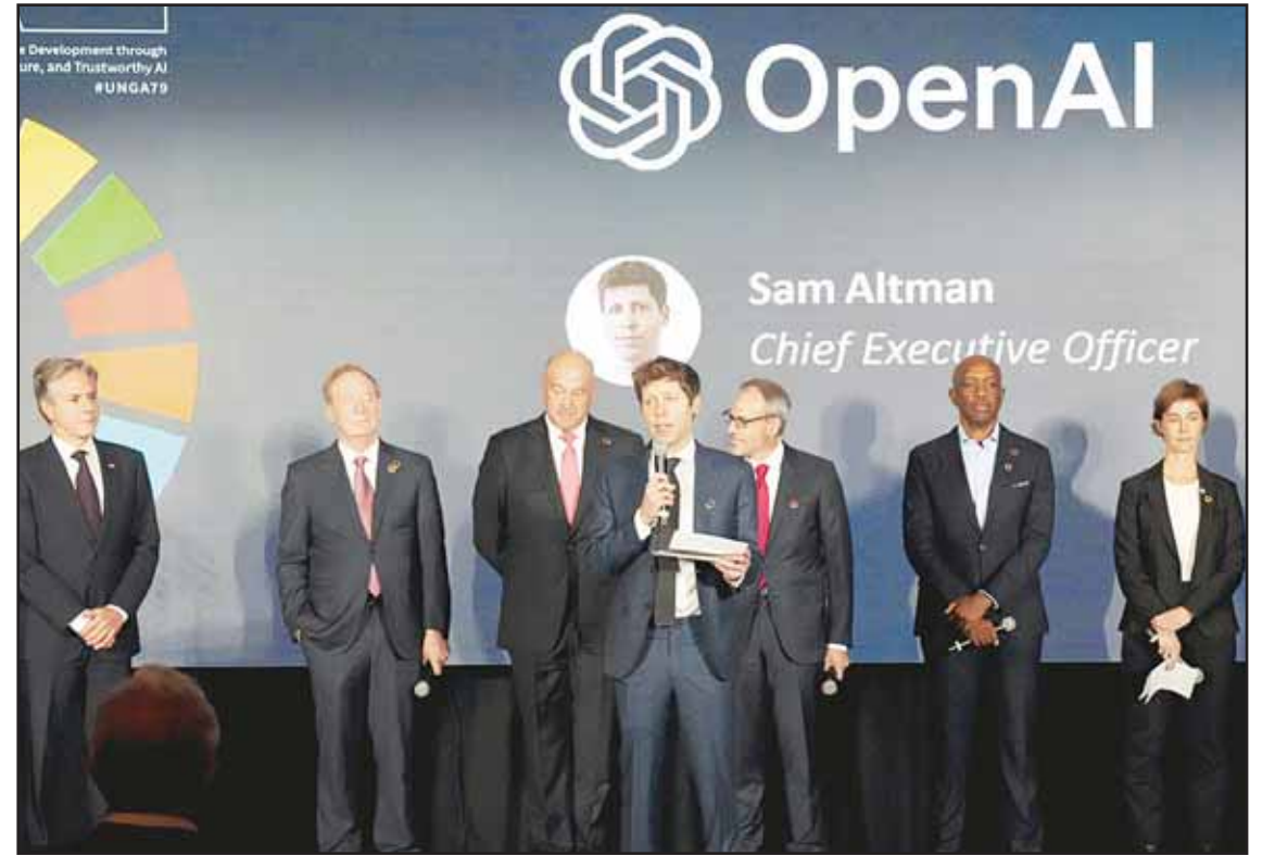
Open AI Chief Executive Officer Sam Altman, center, speaks at the Advancing Sustainable Development through Safe, Secure, and Trustworthy AI Event on Sept. 23, 2024, in New York.