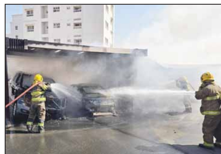
Firefighters putting out the blaze to the vehicles.

The primary objective of these visits is to strengthen national identity and belonging among students, while underscoring the collective responsibility to protect and uphold the Kuwaiti national flag as a symbol of the state's identity.