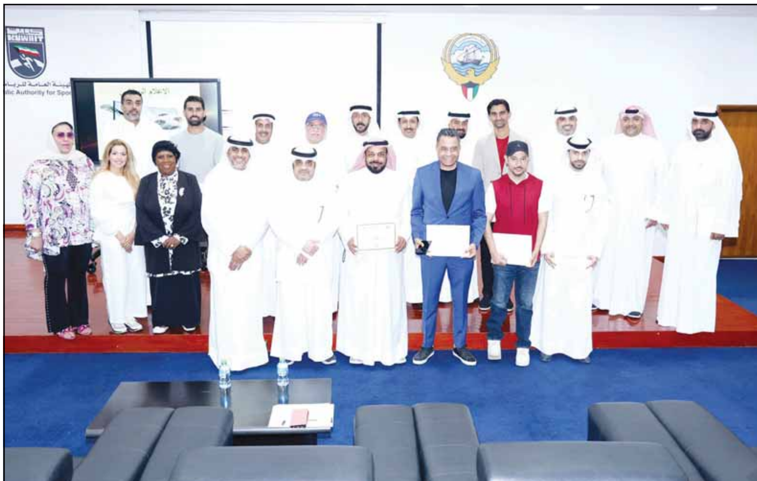
Group photo of the course participants.

Dr. Al-Khayat also highlighted the broader scope of sports media, stating that it should encompass not just news transmission but also address psychological, social, mental, economic, and philosophical dimensions.