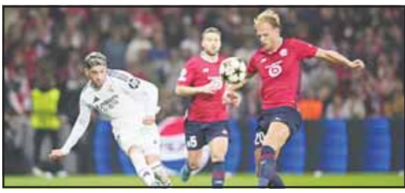
Real Madrid's Federico Valverde, left, passes the ball challenged by Lille's Mitchel Bakker during the Champions League opening phase soccer match between Lille and Real Madrid at the Stade Pierre Mauroy in Villeneuve-d'Ascq, outside Lille, France.