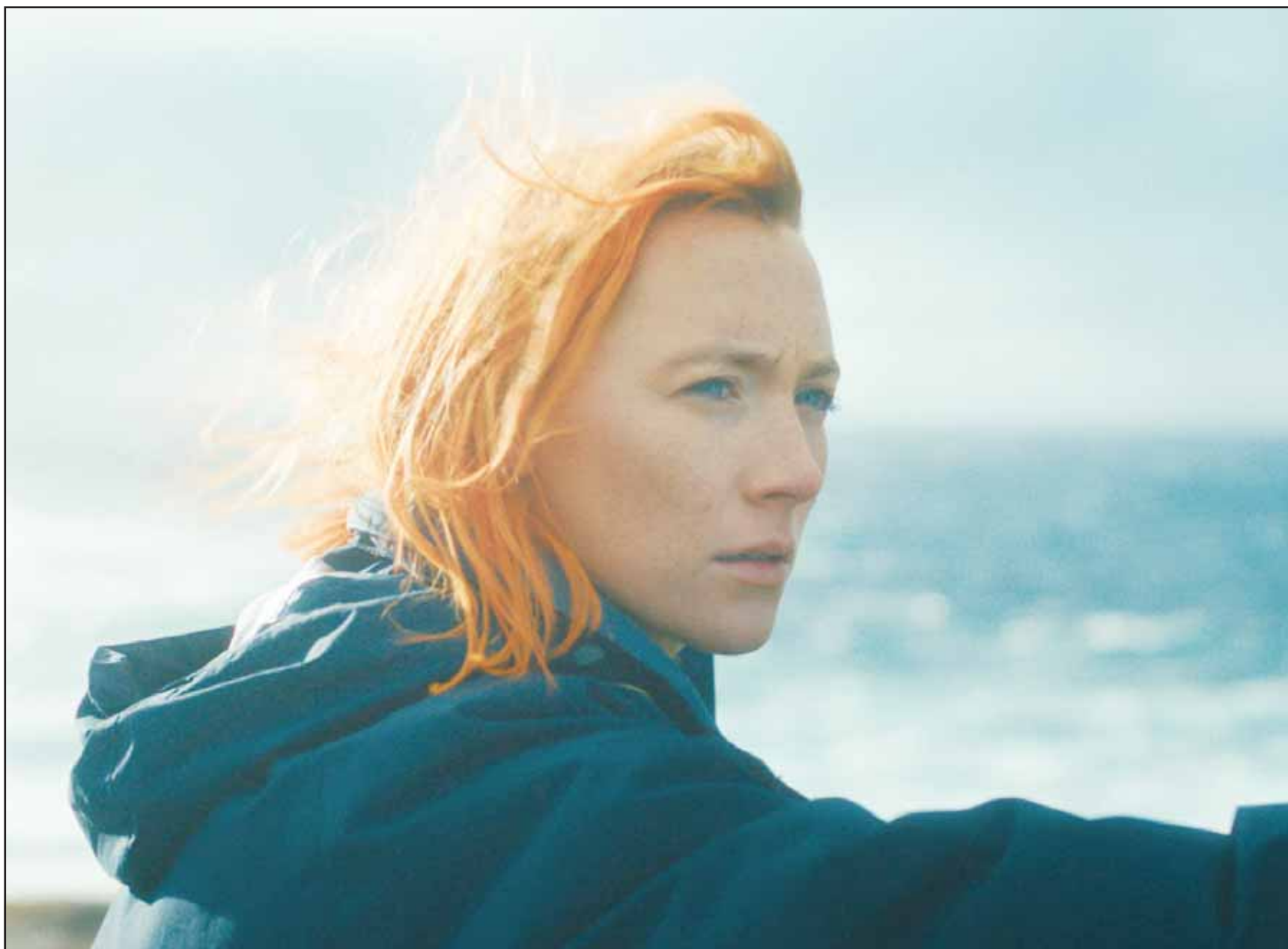
This image released by Sony Pictures Classics shows Saoirse Ronan in a scene from 'The Outrun.' (AP)