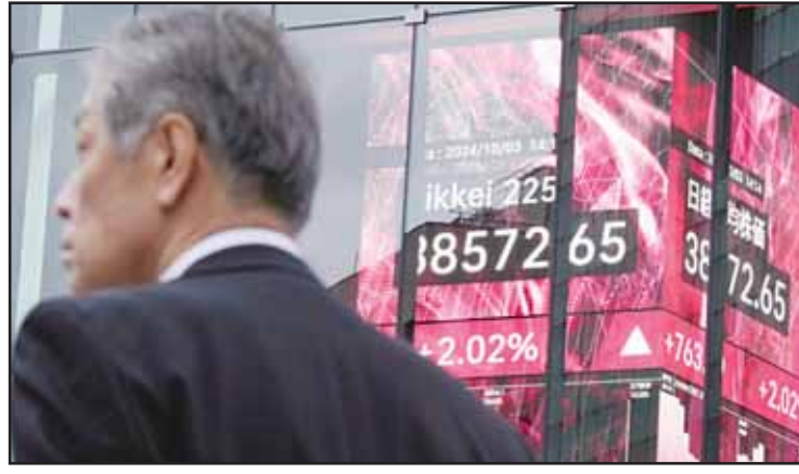
A person stands in front of an electronic stock board showing Japan's Nikkei index at a securities firm, Thursday, Oct. 3, 2024, in Tokyo.

The meeting between Ishiba and Ueda had not been expected to