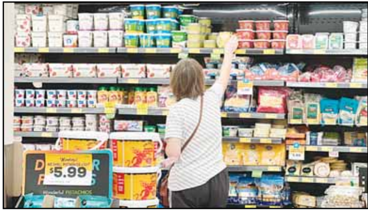
A customer looks at refrigerated items at a Grocery Outlet store in Pleasanton, Calif., Thursday, Sept. 15, 2022.