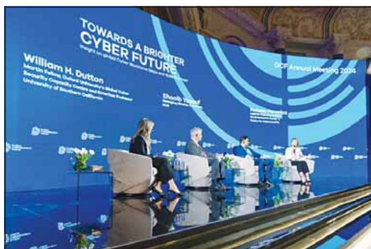
Global Cybersecurity Forum Panel.