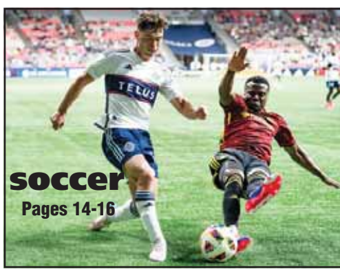
Soccer Pages 14-16