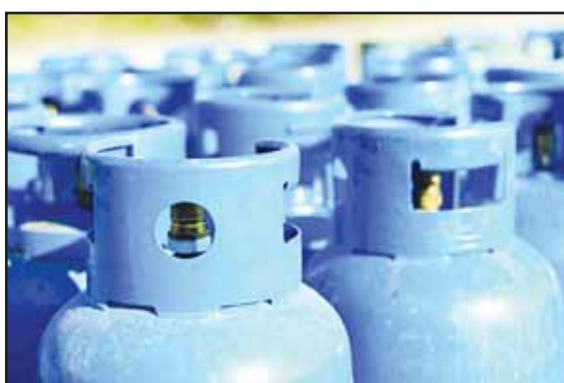
File photo of gas cylinders.

A security source confirmed that the case was referred to the concerned