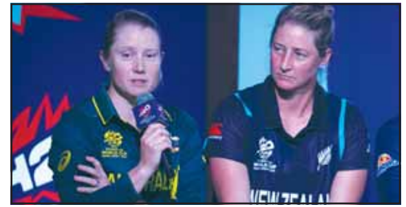
New Zealand captain Sophie Devine, right, watches Australia captain Alyssa Healy speak during a special panel session featuring captains of the 10 countries participating in the Women's T20 World Cup.