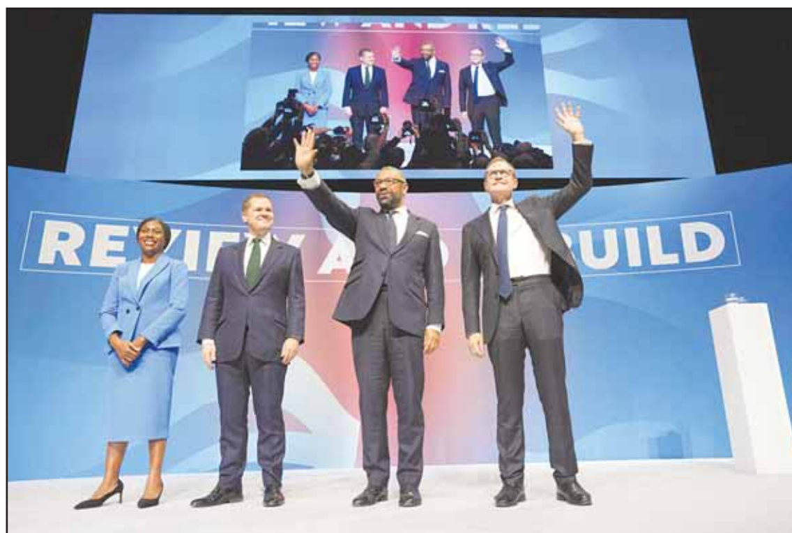
Conservative leadership candidates Kemi Badenoch, (from left), Robert Jenrick, James Cleverly and Tom Tugendhat stand on the podium during the Conservative Party Conference at the International Convention Centre in Birmingham, England on Oct 2.