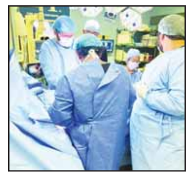
Photo during the four-day workshop of complex surgeries at the Amiri Hospital.

He added "although these surgeries are considered high-risk and with complications, we achieved the best