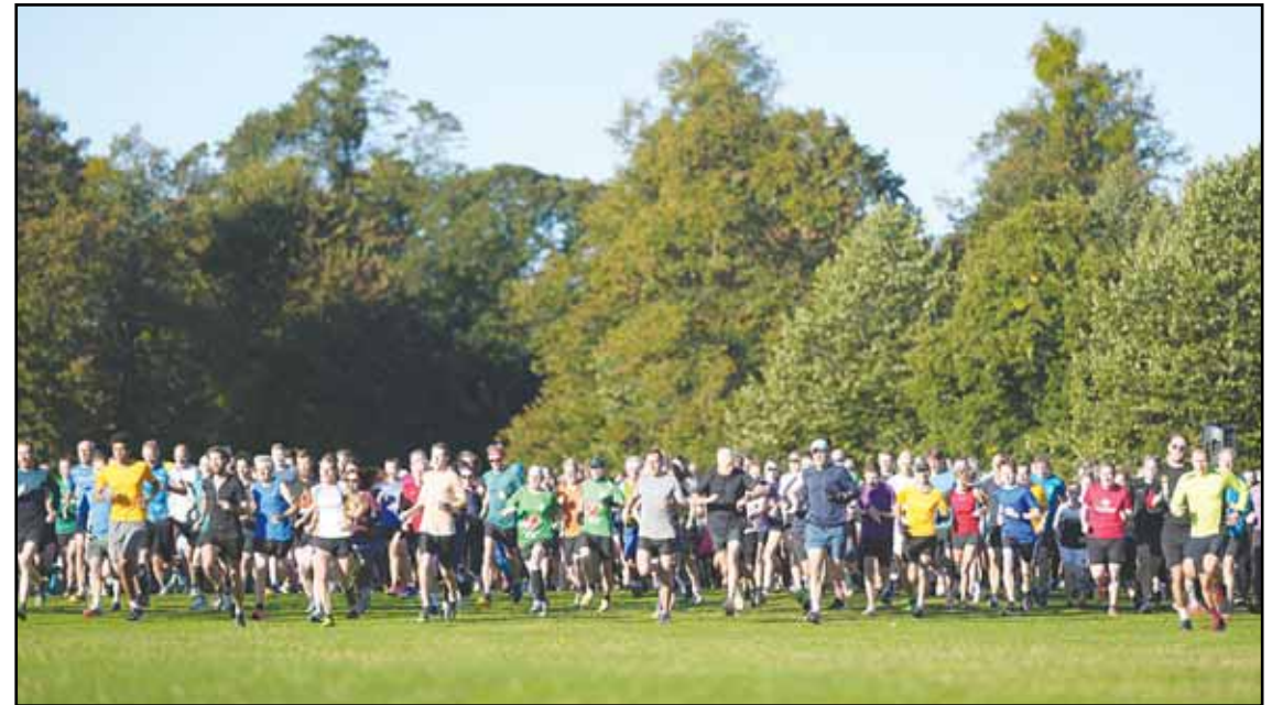
Runners compete in the parkrun event in Bushy Park, southwest London, Saturday, Sept. 28, 2024.

Even as scientists are creating climate-resilient seeds regularly, making sure the seeds reach the maximum number of farmers is critical.