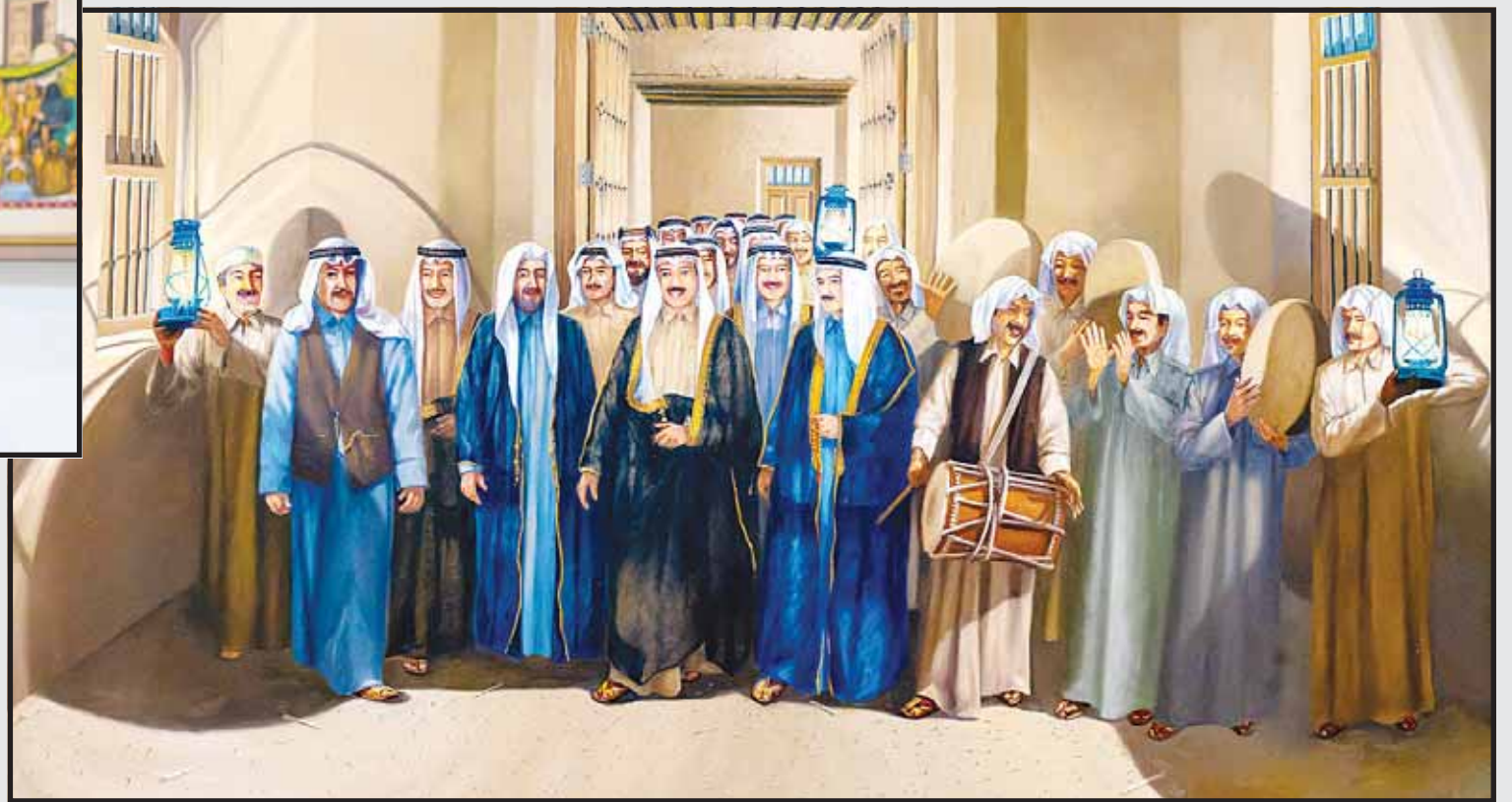
The old Kuwaiti wedding paintings are the creations of visual artist Ibrahim Shukrallah.