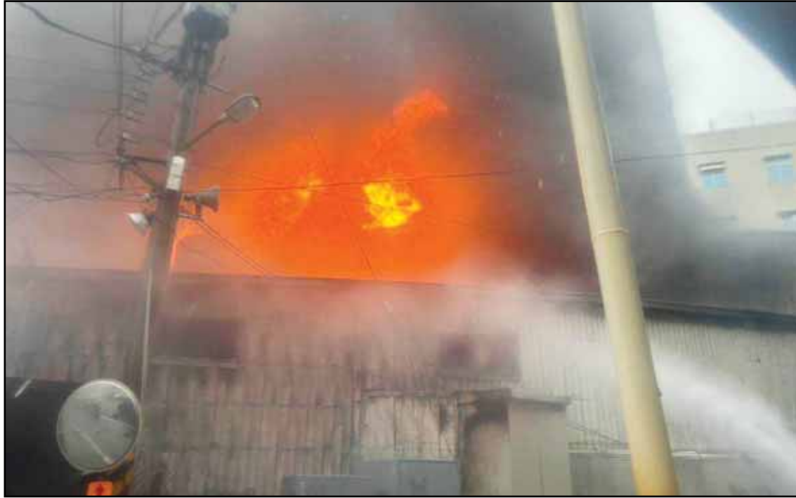
In this photo taken Oct. 3, 2024 and released by the Pingtung County Government, a fire breaks out at a hospital in Pingtung county in southern Taiwan. (AP)

Thousands were evacuated from areas vulnerable to mudslides and landslides. Almost 40,000 troops were on standby to help with rescue efforts.