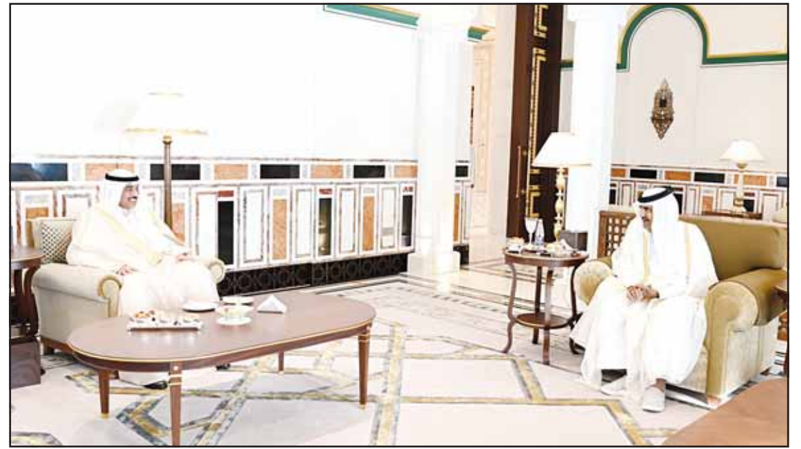
Crown Prince Diwan photo

His Highness the Prime Minister Sheikh Ahmad Abdullah Al-Hamad Al-Sabah sent a cable of congratulations to President of Germany Frank-Walter Steinmeier on his country's national day.