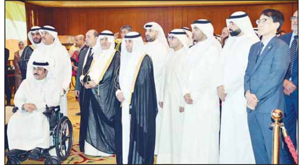
Photos during the event.