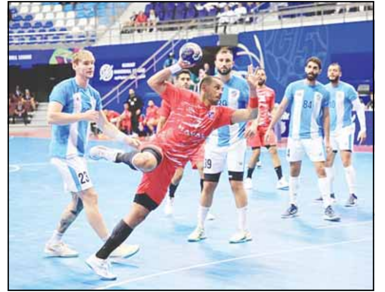
A file photo of players in action.