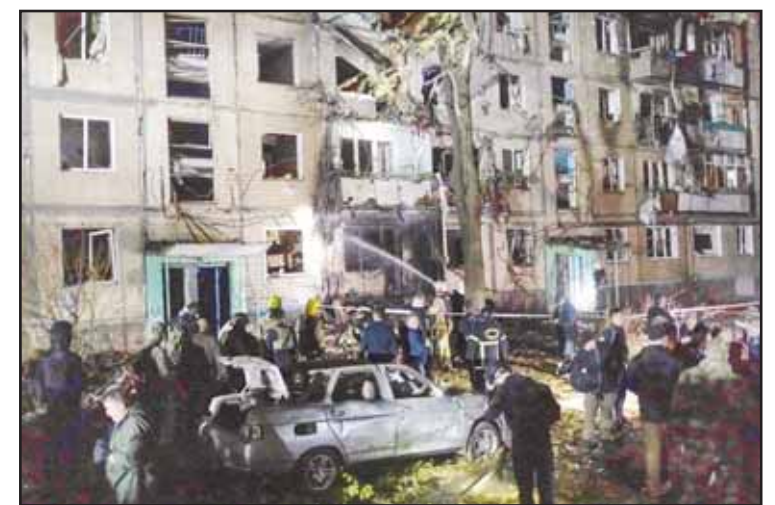
Rescue workers clear the rubble of a building damaged by a Russian airstrike in Kharkiv, Ukraine on Oct 2.

Glide bombs have become an increasingly common weapon in the war. They have terrorized civilians and bludgeoned the Ukrainian army's front-line defenses.