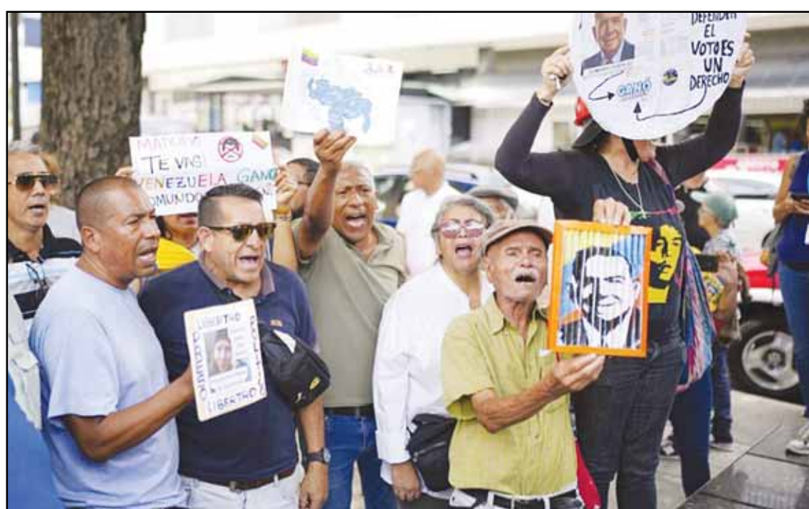
People protest against the reelection of President Nicolás Maduro two months after the disputed presidential vote which opposition leaders say they won by a landslide in Caracas, Venezuela on Sept. 28.