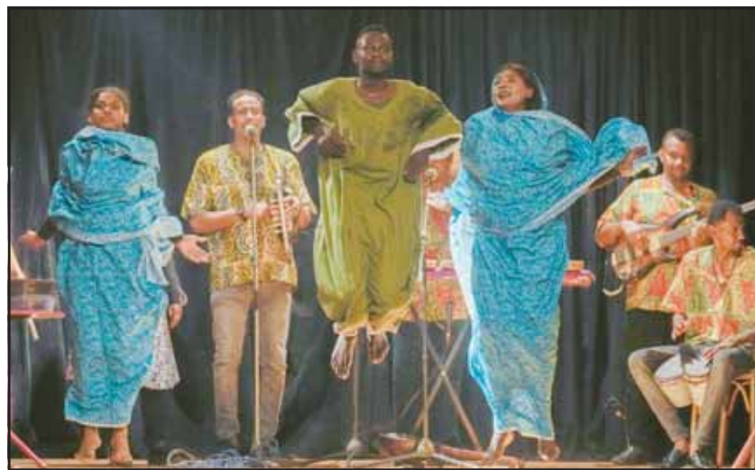
Sudanese Camirata troupe perform at the Italian culture center in Cairo, Egypt, July 24, 2024.

Founded in 1997, the band rose to popularity in Khartoum before it began traveling to different states, enlisting diverse musicians, dancers and styles. They sing in 25 different Sudanese languages. Founder Daffallah el-Hag said the band's members started relocating to Egypt in recently, as Sudan struggled through a difficult economic and political transition after a 2019 popular uprising unseated longtime ruler Omar al-Bashir. Others followed after the violence