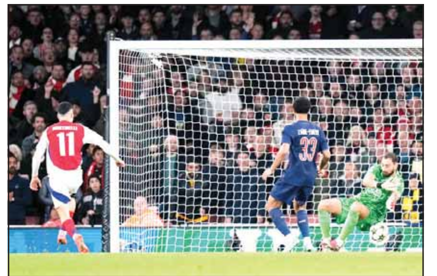
PSG's goalkeeper Gianluigi Donnarumma saves a shot from Arsenal's Gabriel Martinelli, left, during a Champions League opening phase soccer match between Arsenal FC and Paris Saint-Germain at Arsenal stadium in London, England.

But Donnarumma's trajectory is not going the way many observers expected it to.