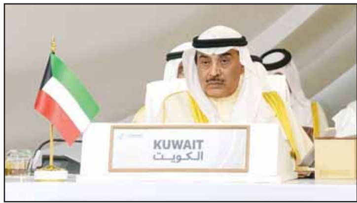
His Highness the Crown Prince at the third summit of the Asian Cooperation Dialogue (ACD) in Doha.

'Attack on Lebanon breaches international norms and laws'