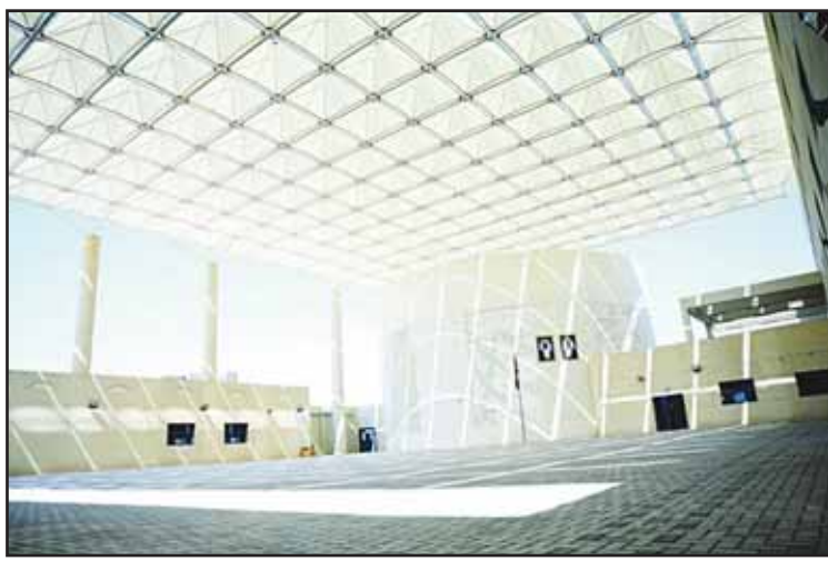
A model of one of the umbrellas of the flag square in smart schools.

ity of the participation of donors in the maintenance of school buildings, as long as the instructions of the concerned entities are followed during the implementation of the project and in accordance with its regulations; such as obtaining the approval of its finance counterpart to receive donations, specify the type of donation and the beneficiaries, the party in charge of implementation as per the agreement between the donor and the beneficiary.