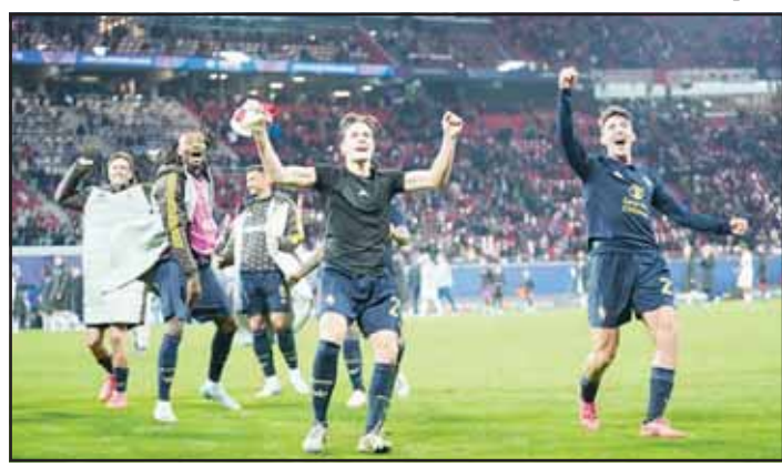
Juventus players celebrate after the UEFA Champions League opening phase soccer match between Leipzig and Juventus in Leipzig, Germany.

In Como's last three matches, it held Champions League side Bologna to 2-2, won at Champions League side Atalanta 3-2 and beat Hellas Verona 3-2 to move into the top half of the table in 10th.