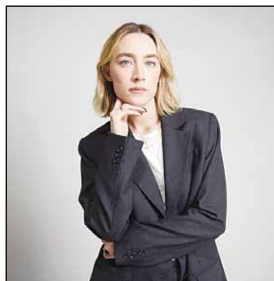
Saoirse Ronan poses for a portrait on Sept. 27, 2024, in New York.

"You just got to get in there and do it," she laughed.