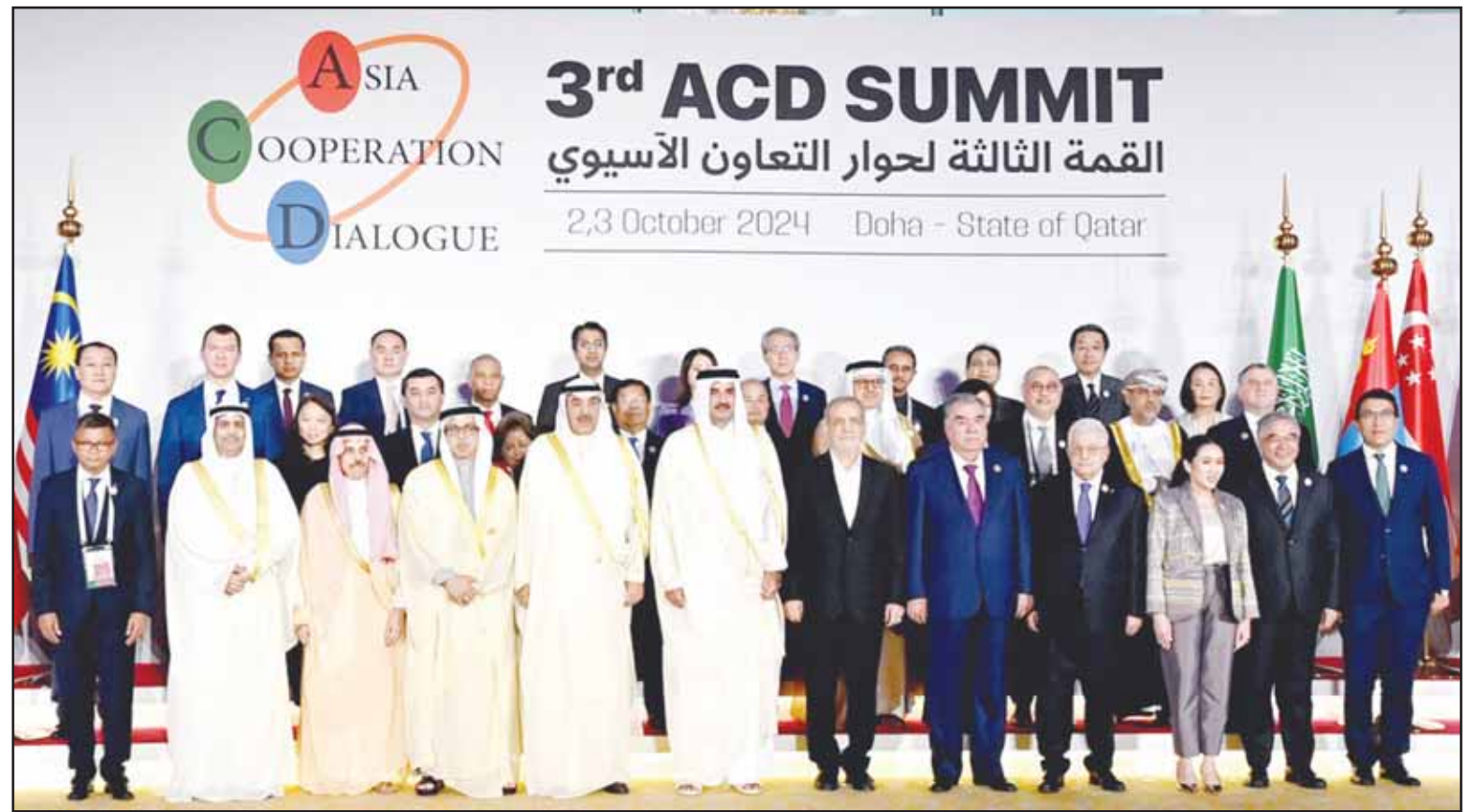
Participants of the Third Asian Cooperation Dialogue (ACD) Summit gather for a group photo.