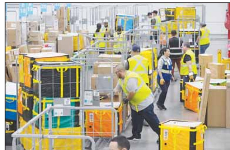
Amazon employees load packages on carts before being put on trucks for distribution to customers for Amazon's annual Prime Day event at an Amazon's DAX7 delivery station on July 16, 2024, in South Gate, Calif.