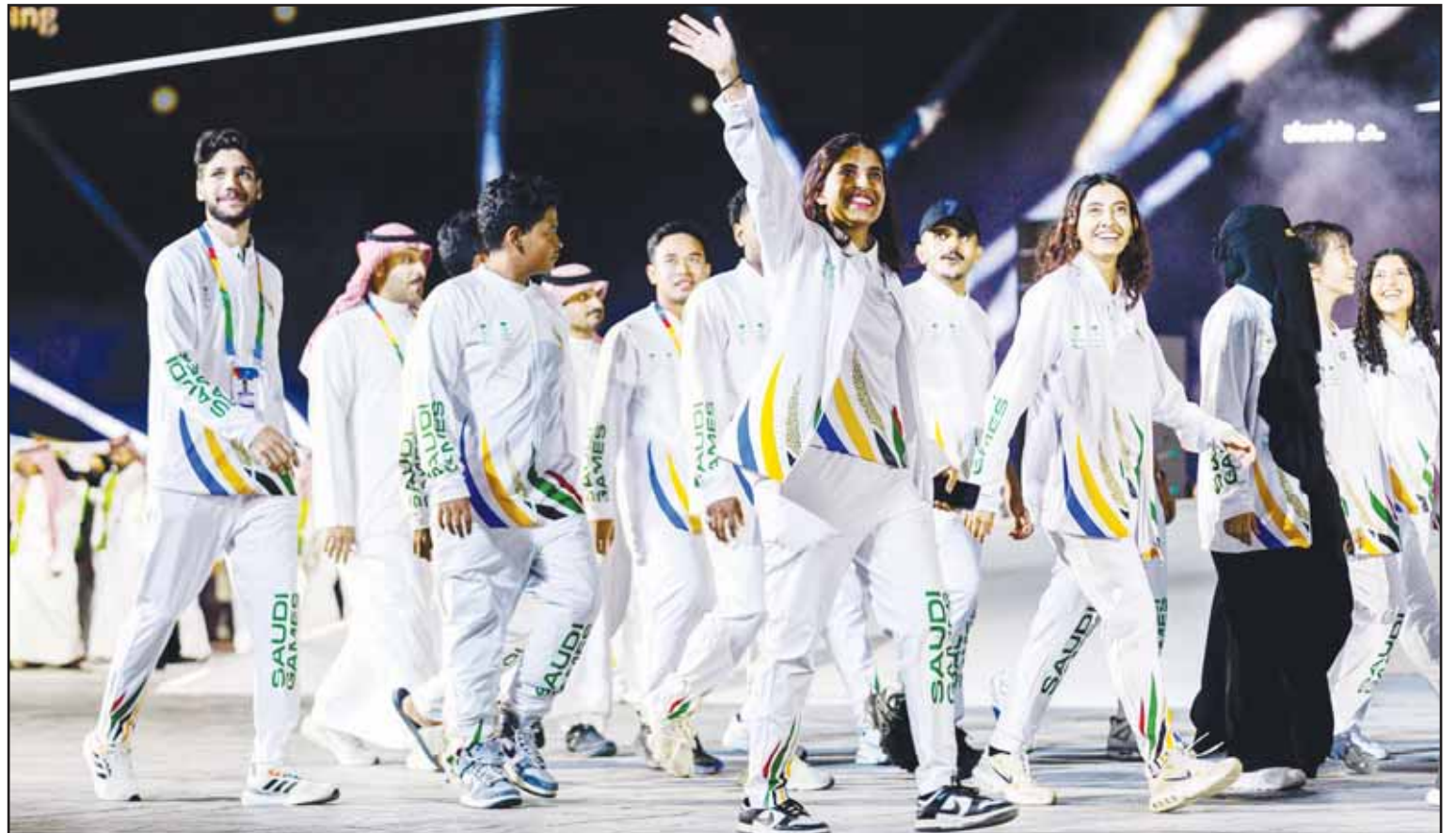
Athletes wave to fans during the opening ceremony of the Saudi Games in Riyadh.

The Fan Zone will feature sports such as 3x3 basketball, beach volleyball, climbing, and skateboarding. Camel racing and show jumping will take place at the Saudi Show Jumping Field in Janadriyah, with other competitions spread across various locations like billiards at Qoz Center, karting at Dirab Field, sailing at Jubail Marine Sports Club, shooting at Public Security Shooting Field, tennis at Saudi Tennis Federation Stadium, and golf at Riyadh Golf Club.