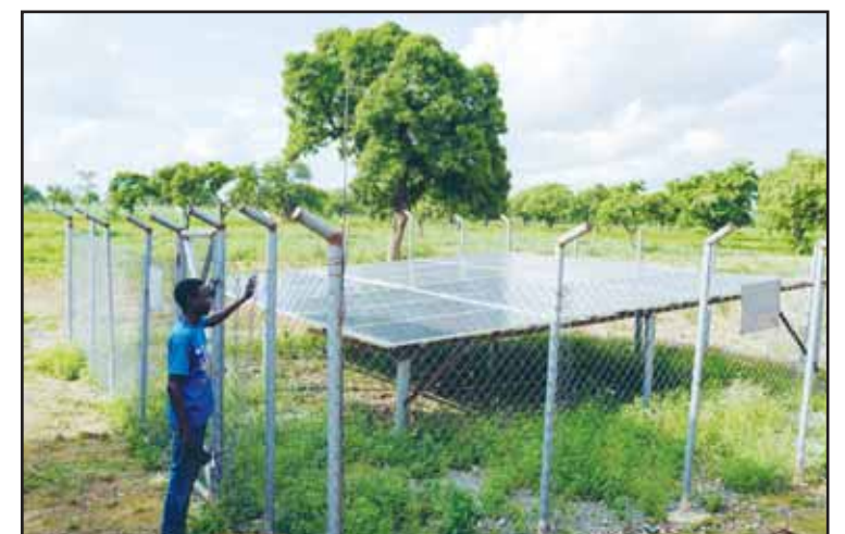
A young man stands by a community radio station solar setup sponsored by a German NGO in Gushegu northern Ghana, Friday Sept. 6, 2024.

The International Energy Agency, in a report earlier this year, said small