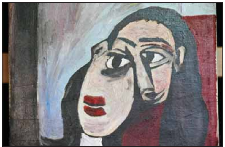
A painting is seen at a restoration laboratory in Milan, Italy, Thursday, Oct. 3, 2024.