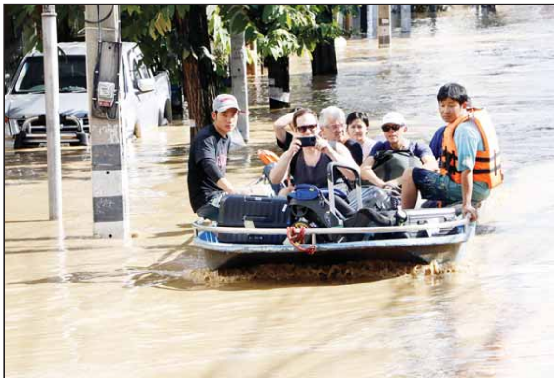
Tourists evacuate from a flood-hit area in Chiang Mai Province, Thailand on Oct 5.

Public outrage over the tragedy has put officials under scrutiny over safety standards after information emerged that the bus had passed an inspection about four months before the fire.