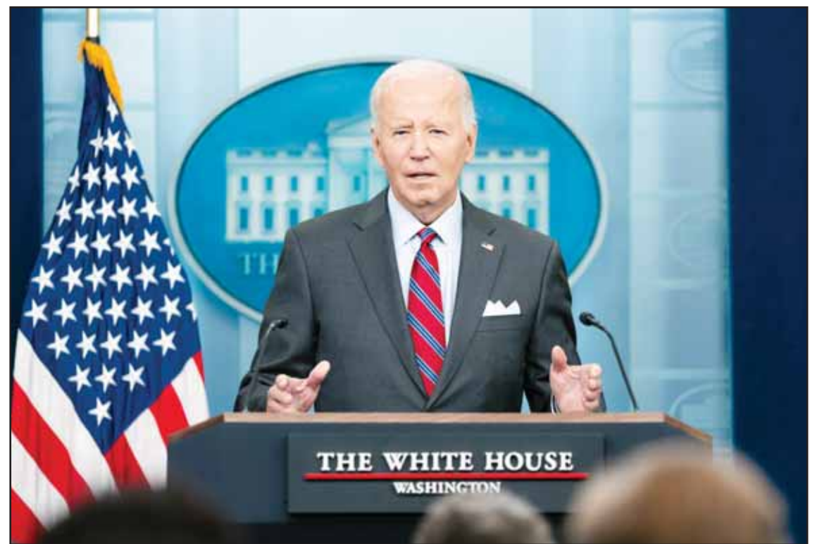
US President Joe Biden speaks at the top of the daily briefing at the White House in Washington on Oct 4.

When asked, Biden clarified his comments from a day earlier about Israel possibly striking Iranian oil facilities, which caused the price of the commodity to jump on the prospect of supplies being squeezed.