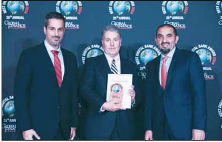
Officials pose for a group photo after receiving the award.