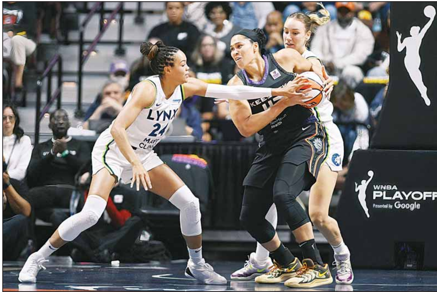
Minnesota Lynx forwards Napheesa Collier, left, and Alanna Smith, right, pressures Connecticut Sun forward Brianna Jones, center, during the first half of a WNBA basketball semifinal game in Uncasville, Conn.