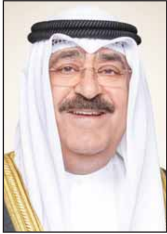
HH the Amir Sheikh Mishal Al-Ahmad Al-Jaber Al-Sabah