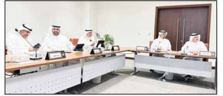
Photo during the Ahmadi Governorate Committee of the Municipal Council meeting chaired by Nassar Al-Azmi, seated right.

The committee referred to the executive body a letter from the Integrated Petroleum Company concerning the allocation of an air defense