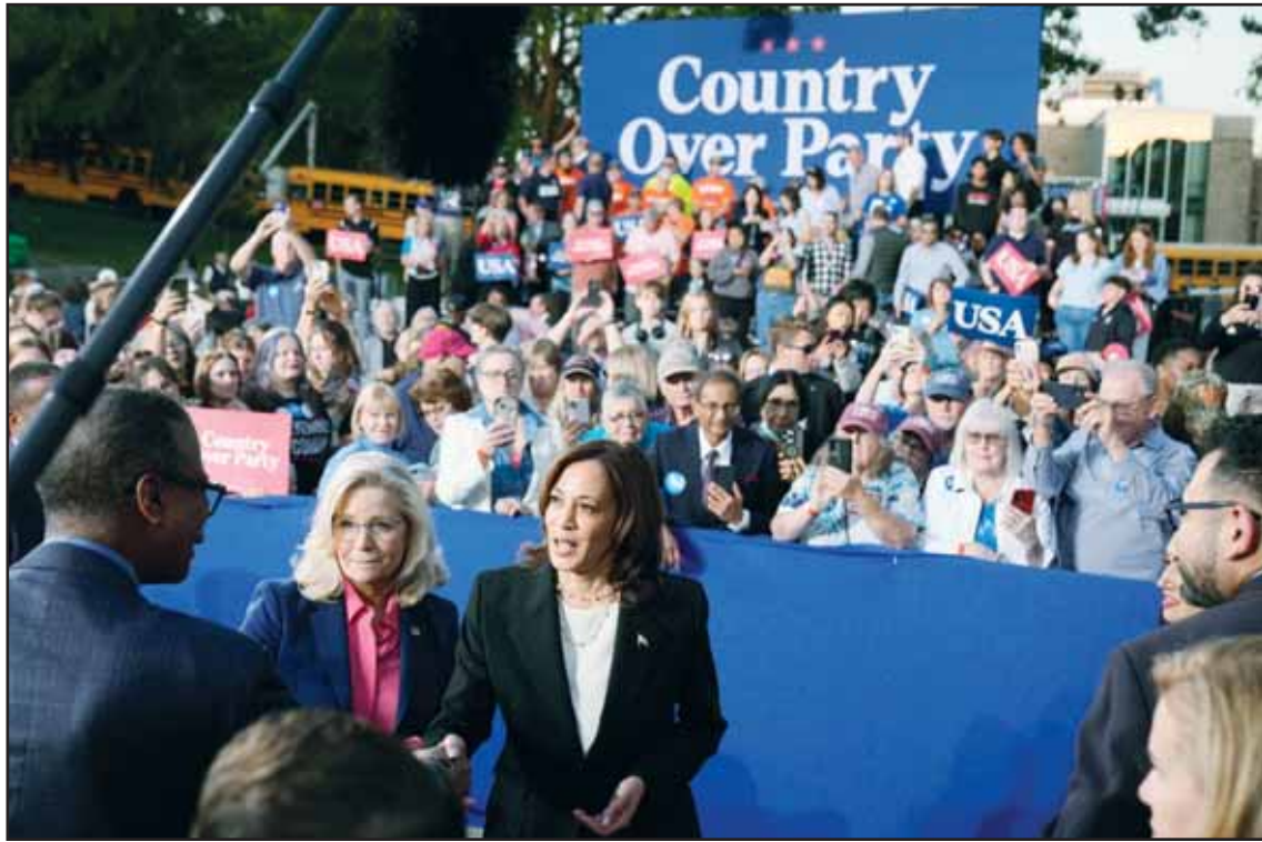
Democratic presidential nominee US Vice President Kamala Harris, (right), and former Congresswoman Liz Cheney, R-Wyo, greet attendees during a campaign event at Ripon College in Ripon, Wis on Oct 3.