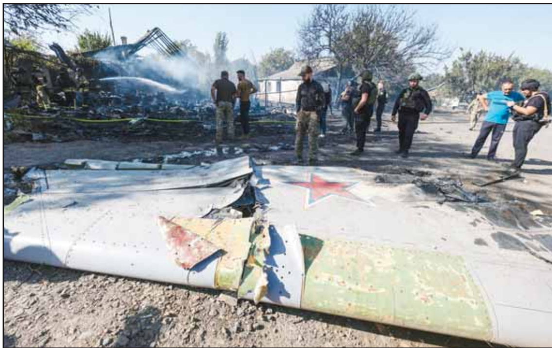
Ukrainian servicemen examine fragments of a Russian military plane that was shot down on the outskirts of Kostyantynivka, a near-front line city in the Donetsk region, Ukraine on Oct 5.