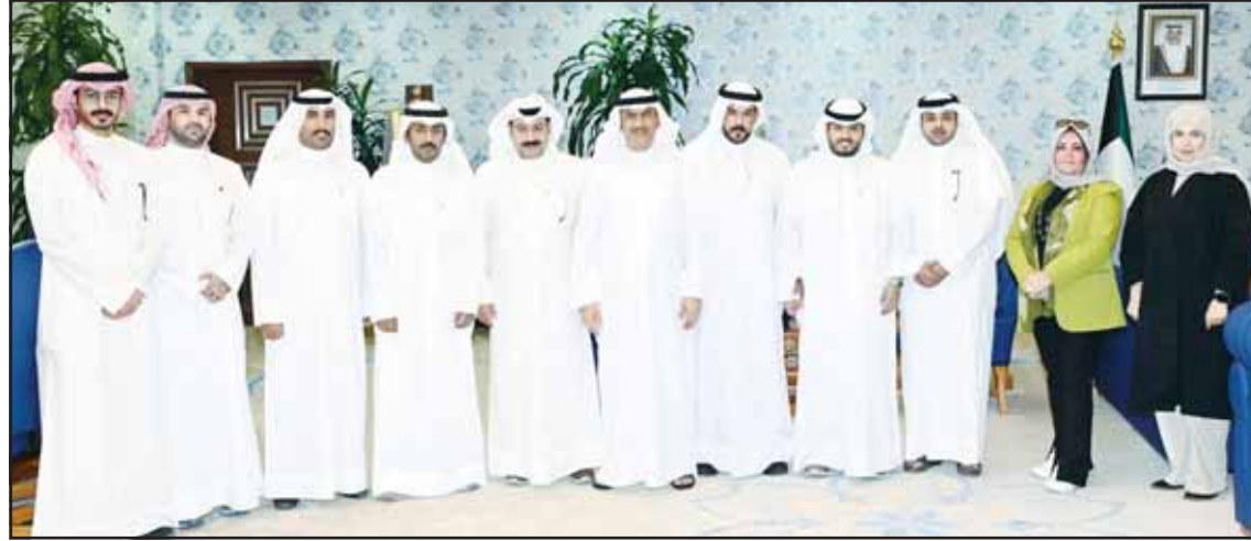
Participants at the meeting pose for a photo.