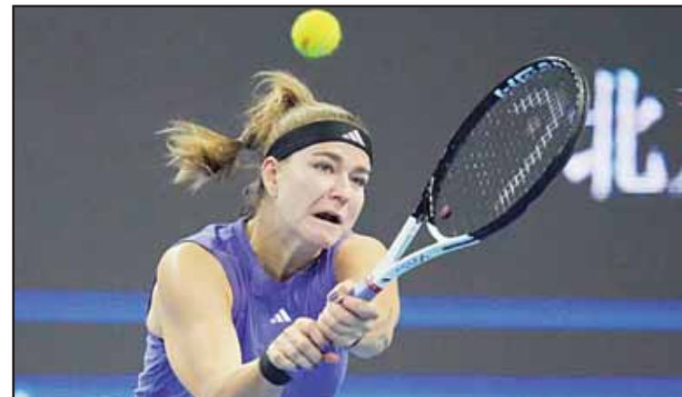
Karolina Muchova of the Czech Republic returns a shot to Zheng Qinwen of the China Open tennis tournament held at the National Tennis Center in Beijing.

nis lately, lifting his first ATP (title in Chengdu), so I'm pretty sure he's