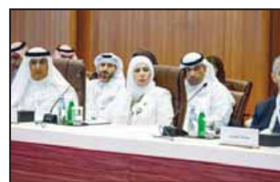
Kuwait's Minister of Finance, Minister of State for Economic Affairs and Investment and Acting Minister of Oil Nora Al-Fassam