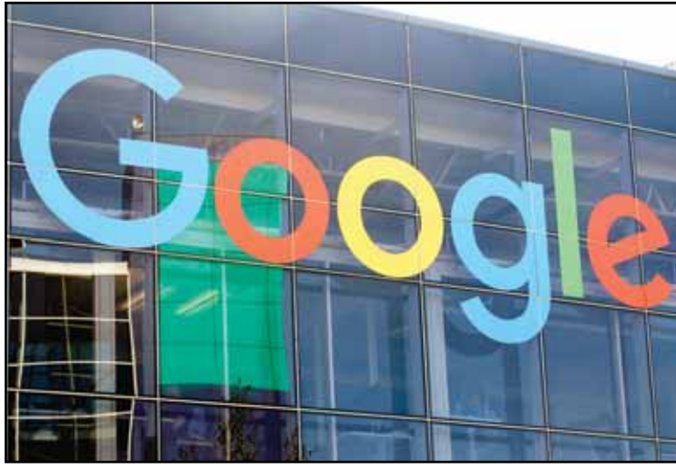
A sign is shown on a Google building at their campus in Mountain View, Calif., on Sept. 24, 2019. (AP)

SAN FRANCISCO, Oct 5, (AP): Google is injecting its search engine with more artificial intelligence that will enable people to voice questions about images and occasionally organize an entire page of results, despite the technology's past offerings of misleading information.