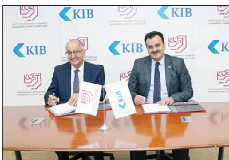
KIB, KCST sign MoU.

KIB will spearhead the organization and management of the innovation program, supported by the expertise of a globally renowned innovation consultant. The agreement is set to allow KCST students to engage in projects that foster innovative ideas and solutions. The students will gain invaluable experience through internships and cooperative education programs at KIB, allowing them to apply their academic knowledge in a real-world banking environment. Moreover, KIB will consider top students and graduates for future employment opportunities, based on their performance during their internships and co-op programs, thus further demonstrating the Bank's commitment to nurturing local talent.