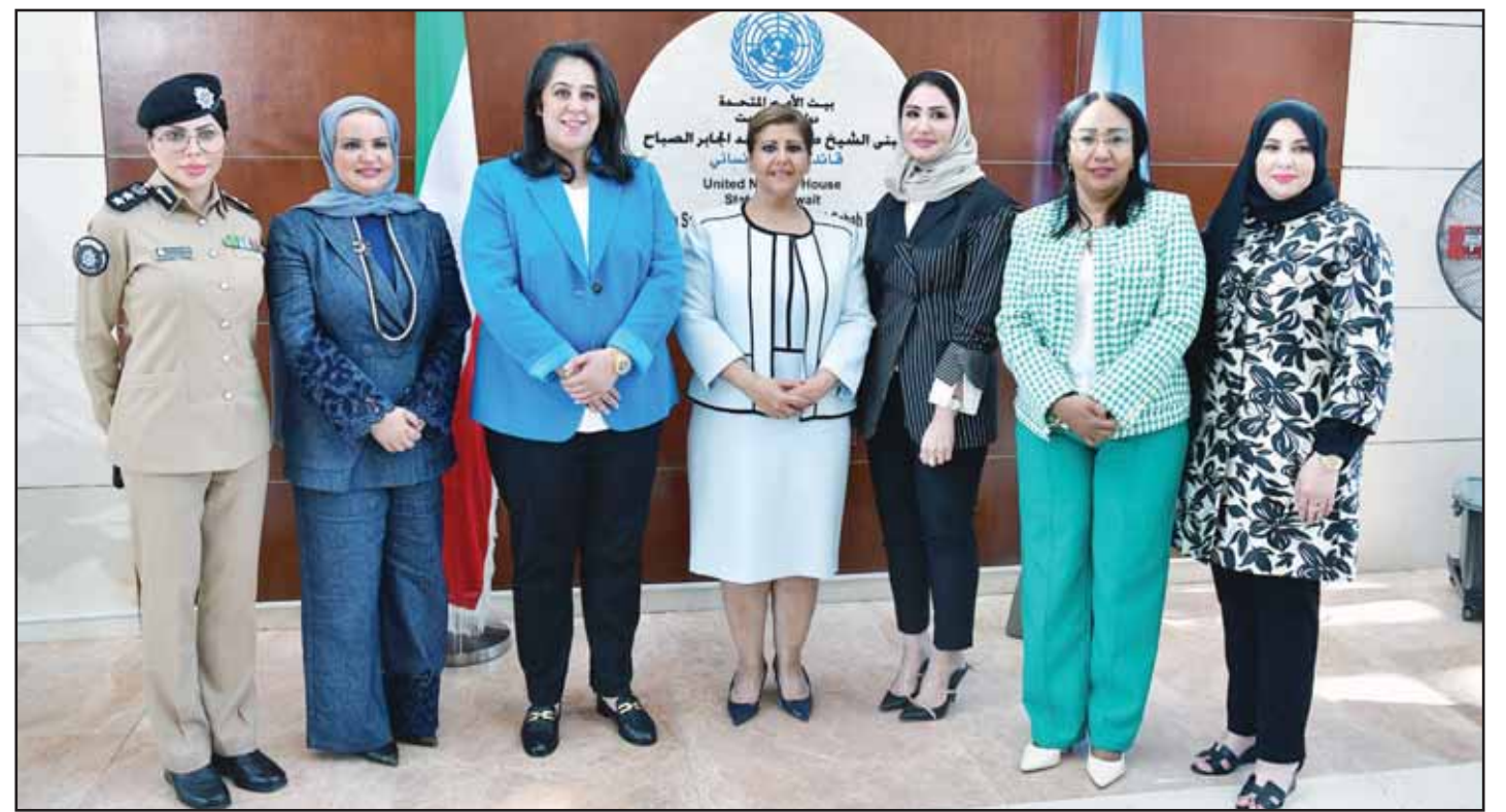
Participants at the forum.

The ministry affirmed that these campaigns are part of ongoing efforts to enhance security and order throughout the country. It also affirmed the continuation of the plan to arrest violators and wanted individuals and ensure public safety.