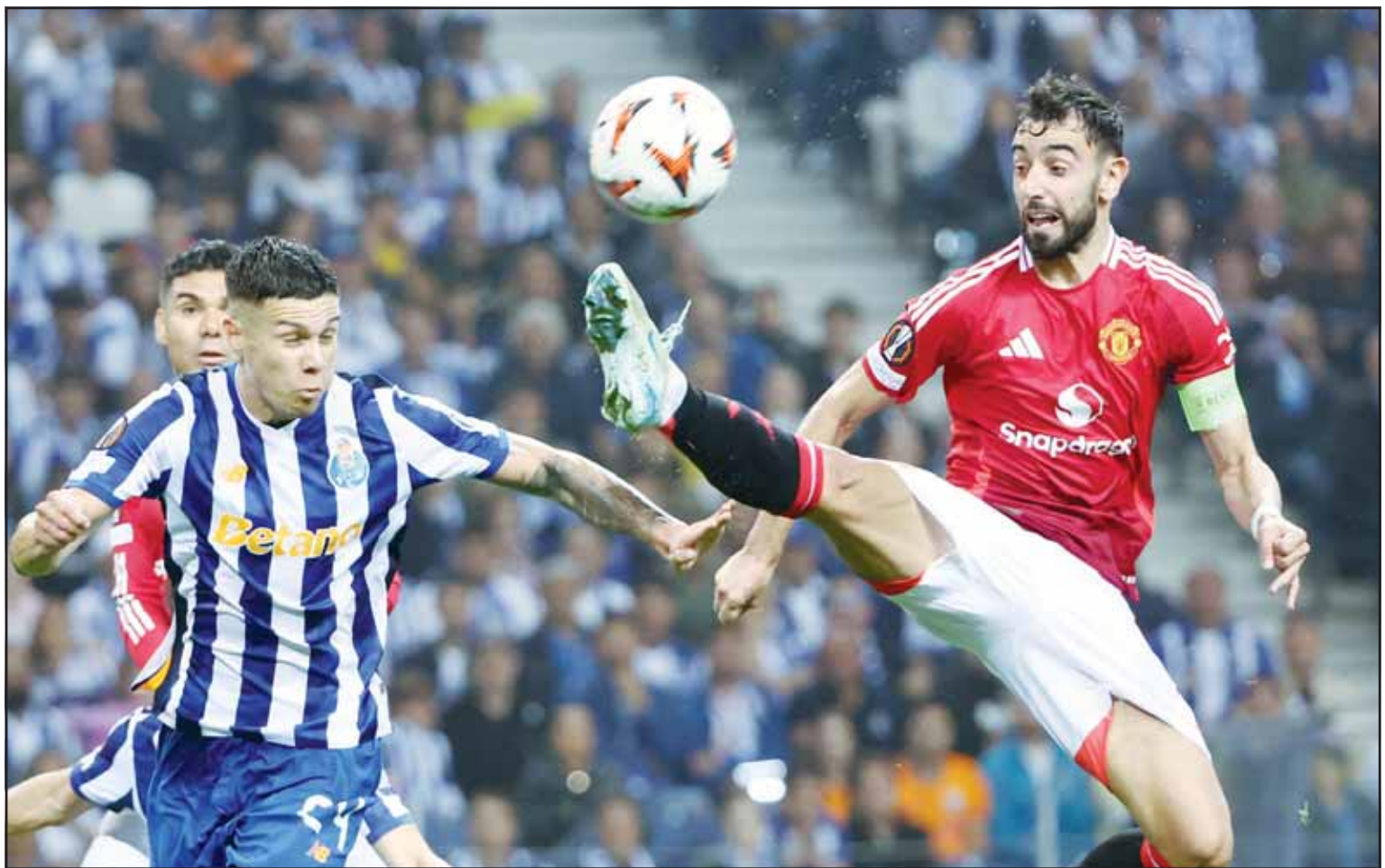
Manchester United's Bruno Fernandes, right, reaches for the ball too high and close to the head of Porto's Nehuen Perez to see a second yellow card and be sent off, during a Europa League opening phase soccer match between FC Porto and Manchester United at the Dragao stadium in Porto, Portugal.

"We are in there together - the ownership, the leadership team, the staff," he said on Thursday. "I appointed a new staff, we bought, again, new young players, and we have to integrate them."