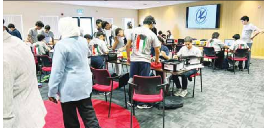
A glimpse of the activities during the qualifiers.