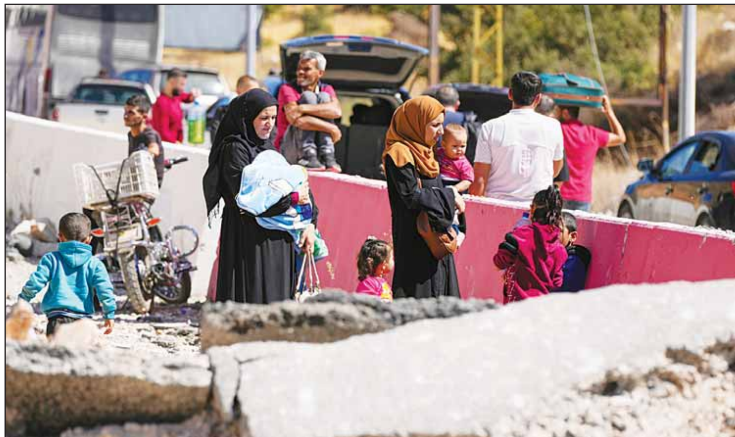
People carry their luggage as they cross into Syria on foot, through a crater caused by Israeli airstrikes aiming to block Beirut-Damascus highway at the Masnaa crossing, in the eastern Bekaa Valley, Lebanon, Saturday, Oct. 5, 2024.

Israel expands bombardment in Lebanon, hits Palestinian camp