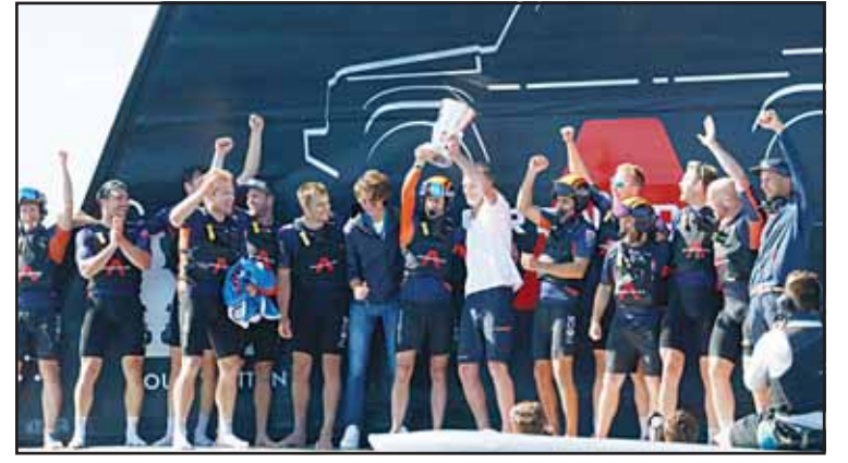
INEOS Britannia's team celebrate their victory against the Luna Rossa Prada Pirelli's sailing team during the Louis Vuitton Cup Final Day 7 at the Barcelona's coast, Spain.

"I think the British out-learned the rest of the challengers, from where