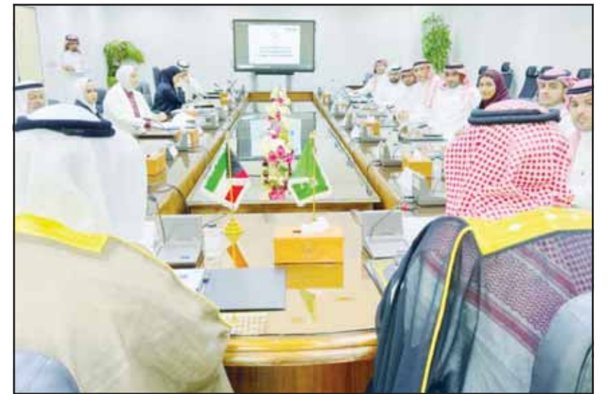
Photo during the meeting by Public Authority for Roads and Transportation with the Saudi delegation.

Tel: +973 17701201 - Ext. 351 | Email: reservation@albander.com | www.albander.com | @albanderhotelandresort