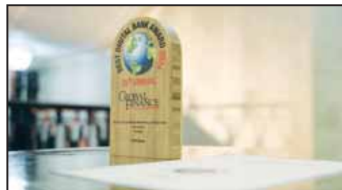
Best Bank in Marketing and Social Media Services Award by Global Finance magazine.

The bank's call center has set a record response