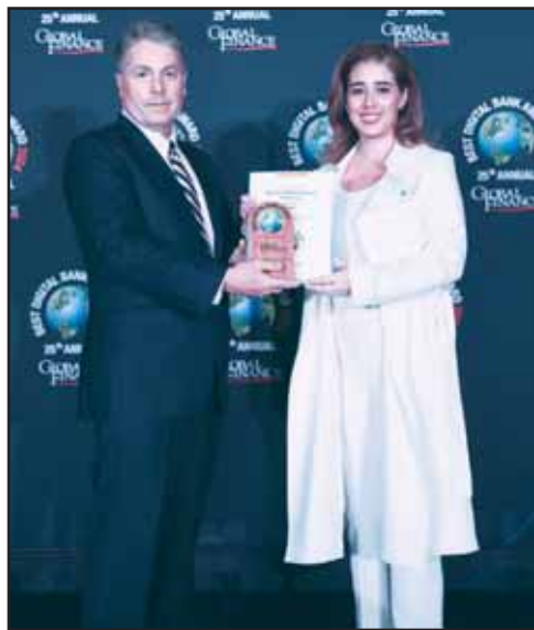
Best Bank in Marketing and Social Media Services Award by Global Finance magazine.