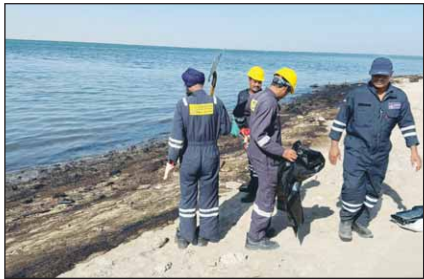
Workers cleaning the East Doha beach after reporting the oil spill.

The well-considered steps taken by the Union towards building a balanced and cohesive society based on respect for women's rights, enhancing their role in building the country's future, and working to empower them in various fields by promoting a culture of participation and equality in rights and duties.