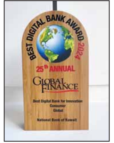
Best Bank for Innovation

KUWAIT CITY, Oct 5: In a new achievement underscoring its leadership and brand strength, National Bank of Kuwait (NBK) has won 9 prestigious awards from Global Finance magazine. The accolades come in recognition of the bank's remarkable strides in innovation, digital transformation, and providing the best banking solutions catering to customers' needs and coping with the rapid technological advancement in the banking industry.