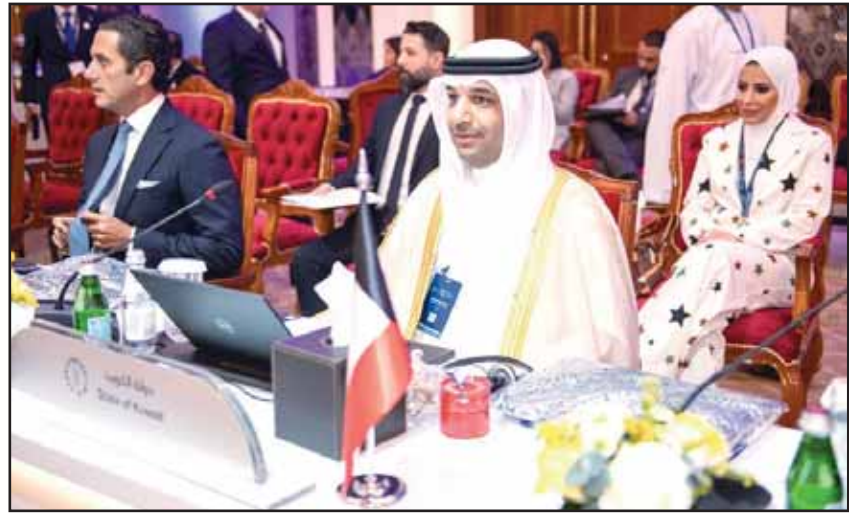
KUNA photo Assistant Undersecretary for Educational Facilities and Planning at the Ministry of Education, Mohammad Al-Khalidi, at the Conference of Ministers of Education of the Islamic World Countries (ICESCO) in Muscat.

Abdaly 38 20 Bubyan 37 15 Jahra 38 25 Failaka Island 36 21 Salmiyah 35 28 Ahmadi 34 19 Jal Aliyah 37 22 Nuwaisib 37 28