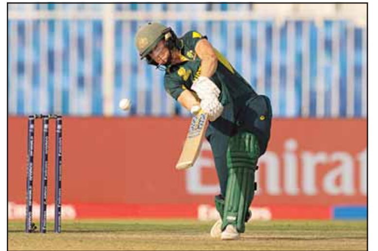
Australia's Ellyse Perry hits a four during the ICC Women's T20 World Cup 2024 match between Australia and Sri Lanka at Sharjah Stadium, United Arab Emirates.