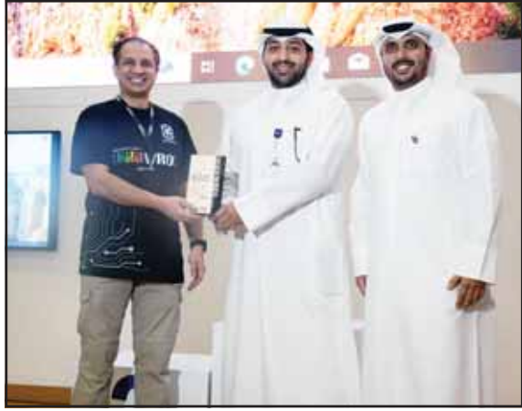
Company was honored by the organizing committee for the championships.

stc Kuwait is a world-class digital leader providing innovative services and solutions to customers, both for individuals and enterprises, enabling the digital transformation in Kuwait, and is a subsidiary of stc Group. stc Kuwait has expanded its portfolio by acquiring companies such as Qualitynet General Trading and Contracting Company (solutions by stc) in Kuwait, and e-portal Holding Company and its subsidiaries.