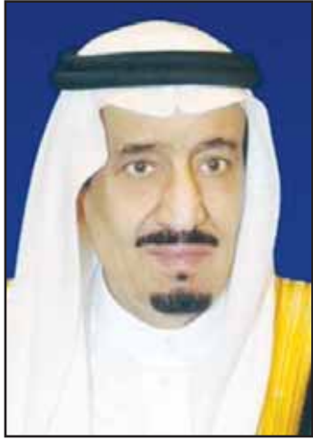
Saudi King Salman bin Abdulaziz Al Saud