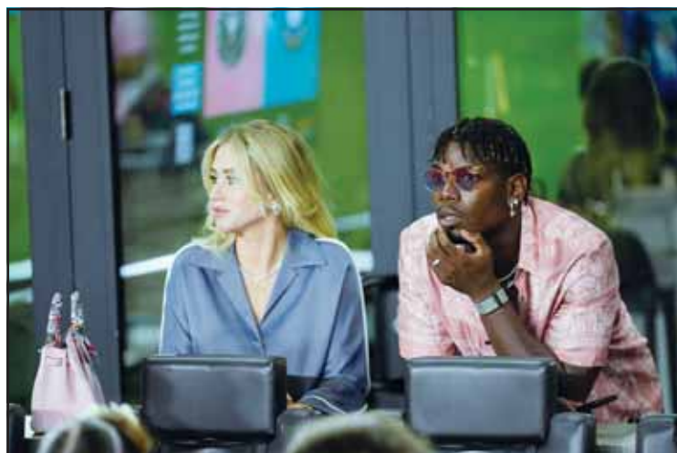
French professional soccer player Paul Pogba, right, watches from a VIP suite at the start of an MLS soccer match between Inter Miami and Charlotte FC in Fort Lauderdale, Fla.

Four-year bans are standard under the world anti-doping code but can