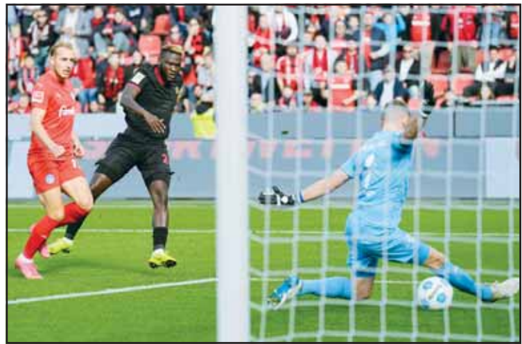
Leverkusen's Victor Boniface scores during the German Bundesliga soccer match between Bayer Leverkusen and Holstein Kiel at the Bay Arena in Leverkusen, Germany.

"I just cannot wait to get back on the pitch," he said.