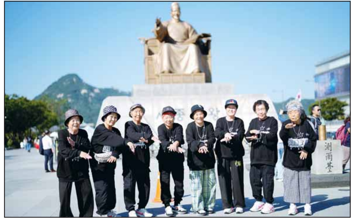
Members of Suni and the Seven Princesses pose for a photo at Gwanghwamun square in Seoul, South Korea, Friday, Oct. 4.