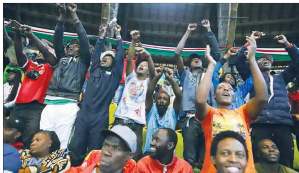
Members of the public react during a public forum for an impeachment motion against Kenya's deputy president Rigathi Gachagua, at Bomas of Kenya, in Nairobi on Oct 4. (AP)

They stressed the need for exploring new opportunities in sectors such as agriculture, energy, education, the semiconductor industry and connectivity, Yunus said. (AP)