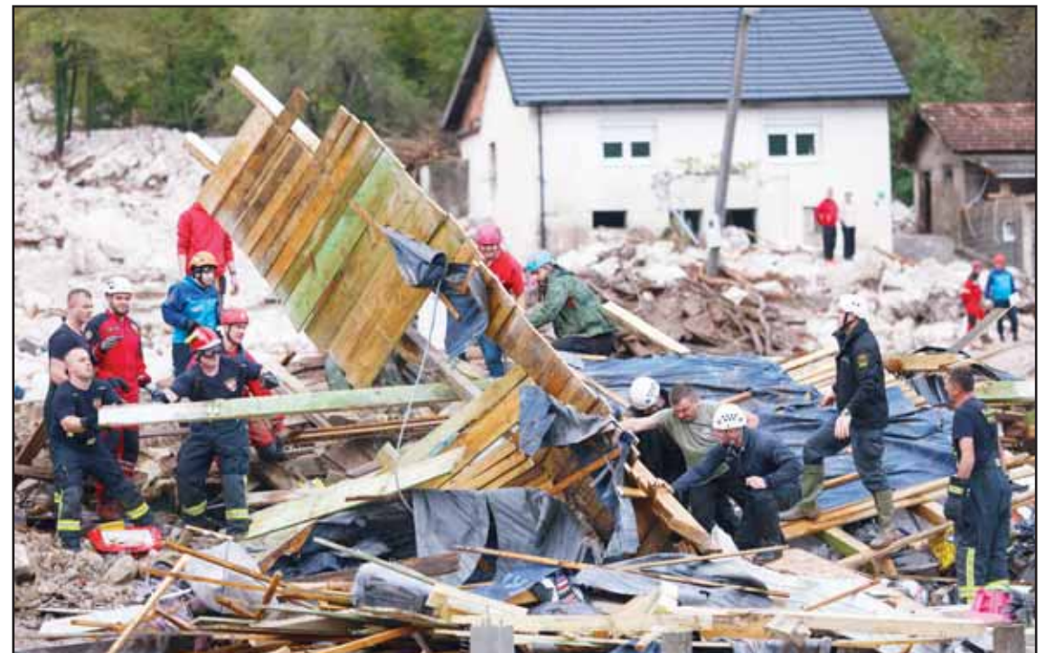
Rescuers search for missing people after floods and landslides in the village of Donja Jablanica, Bosnia on Oct 5. (AP)

When a prosecutor asked him if he got anything in return for his $7 million, Howard testified that he got "a slap in the face." (AP)