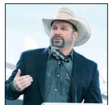
Garth Brooks speaks during a groundbreaking ceremony for the Tennessee Titans new NFL football stadium, Feb. 29, 2024, in Nashville, Tenn.

The woman alleges that in the suite, he appeared naked in the doorway to the bedroom and raped her.