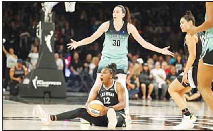
Las Vegas Aces guard Chelsea Gray (12) reacts to a call near New York Liberty forward Breanna Stewart (30) during a WNBA basketball semifinal game in Las Vegas.

Brianna Jones, who had just eight points combined in the first two games, led Connecticut with 21.