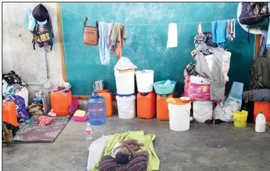
A child sleeps inside a school where displaced people have been taking refuge from gang violence for over a year ago in Port-au-Prince, Haiti on Oct 4.

It is one of the biggest massacres in Haiti's central region in recent years. Attacks of that kind have taken place in the capital of Port-au-Prince, 80% of which is controlled by gangs, and they typically are linked to turf wars, with gang members targeting civilians in areas controlled by rivals.