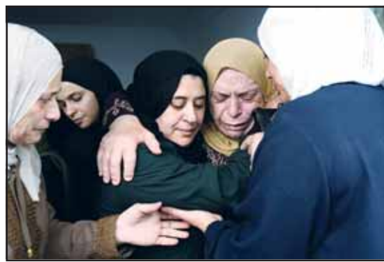
Mourners cry during the funeral of 18 Palestinians who were killed in an Israeli attack in Tulkarem, Friday, Oct. 4, 2024.

Withholding the Nobel Peace is not new. It has been