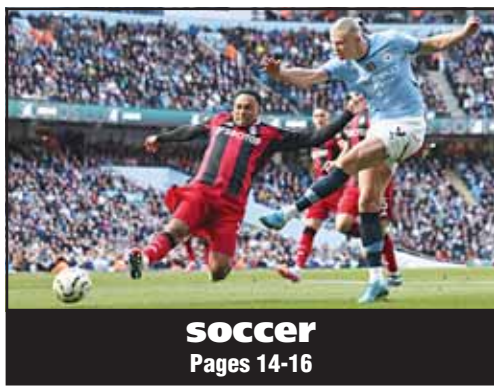
Soccer Pages 14-16