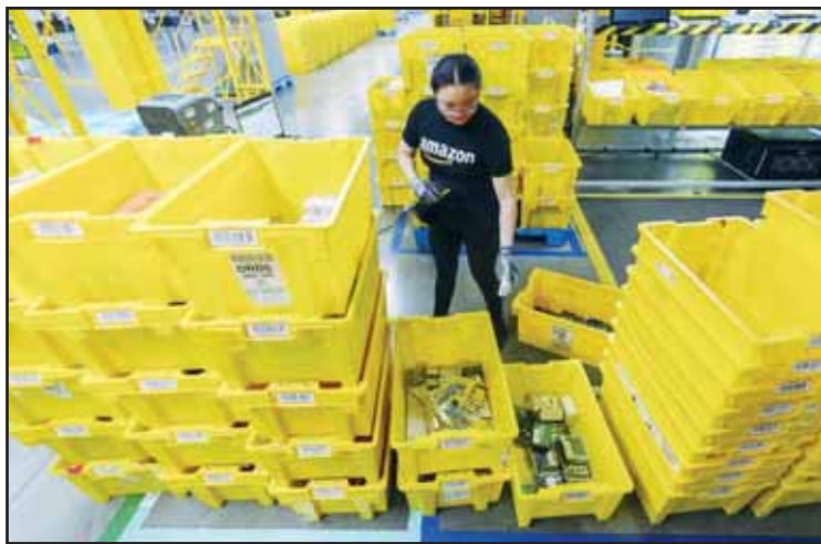
An employee scans incoming items at a receiving station at the Amazon OXR1 fulfillment center in Oxnard, Calif., on Aug. 21, 2024.