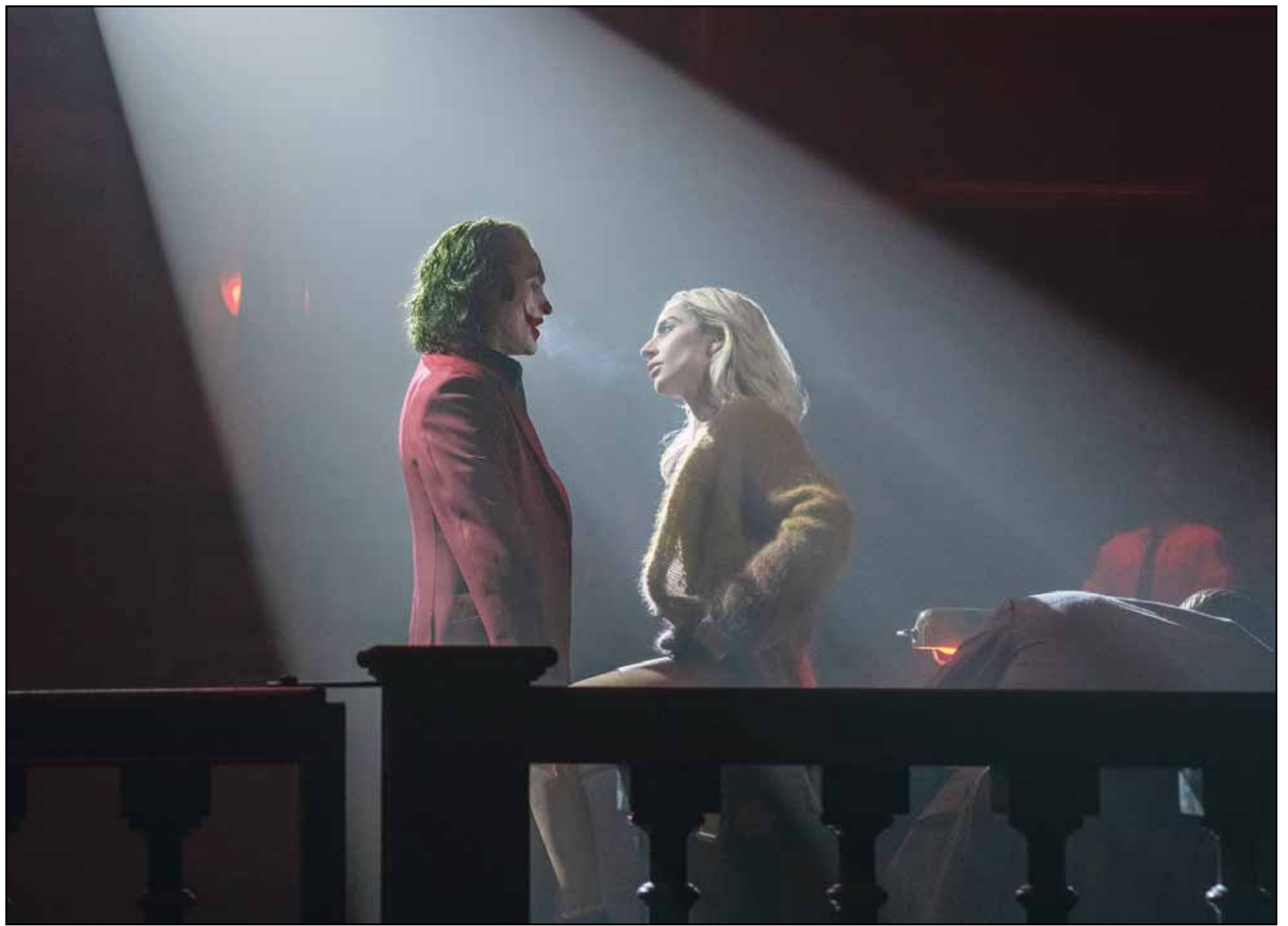
This image released by Warner Bros. Pictures shows Joaquin Phoenix, (left), and Lady Gaga in a scene from 'Joker: Folie à Deux.'