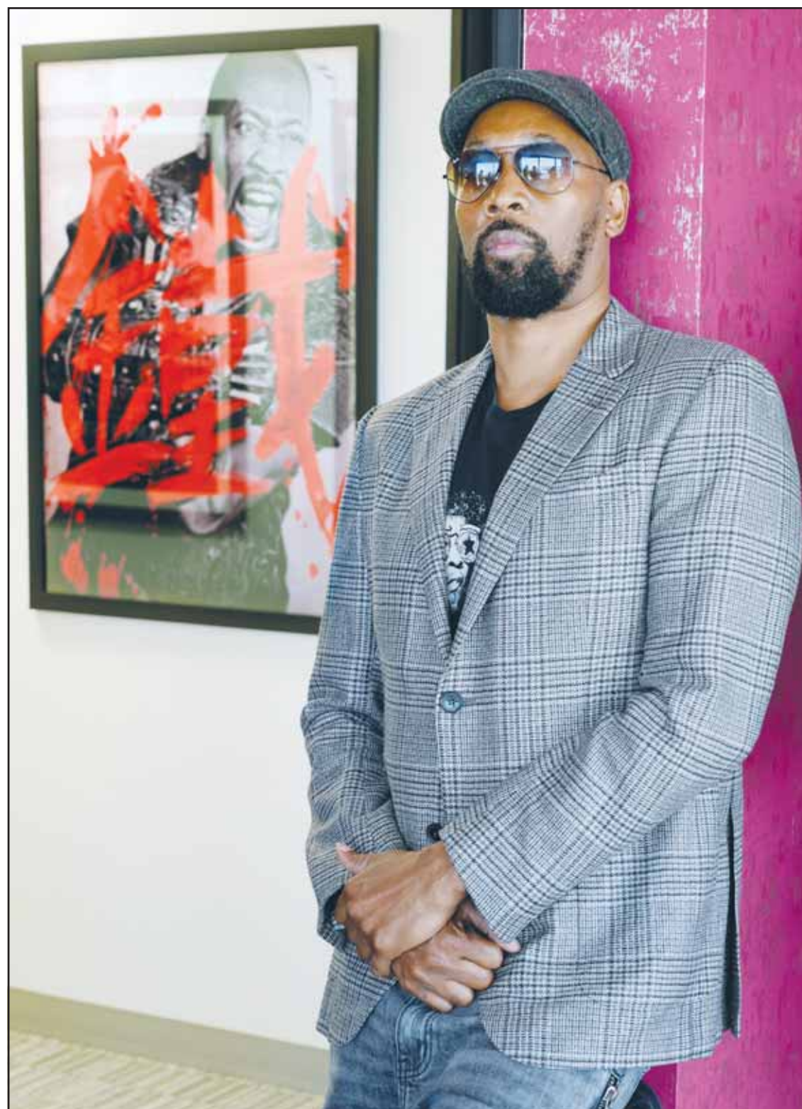
Musician, actor and filmmaker RZA poses for a portrait near a poster for his 2012 film 'The Man with the Iron Fists' at his office, Wednesday, Aug. 28, 2024, in Los Angeles.