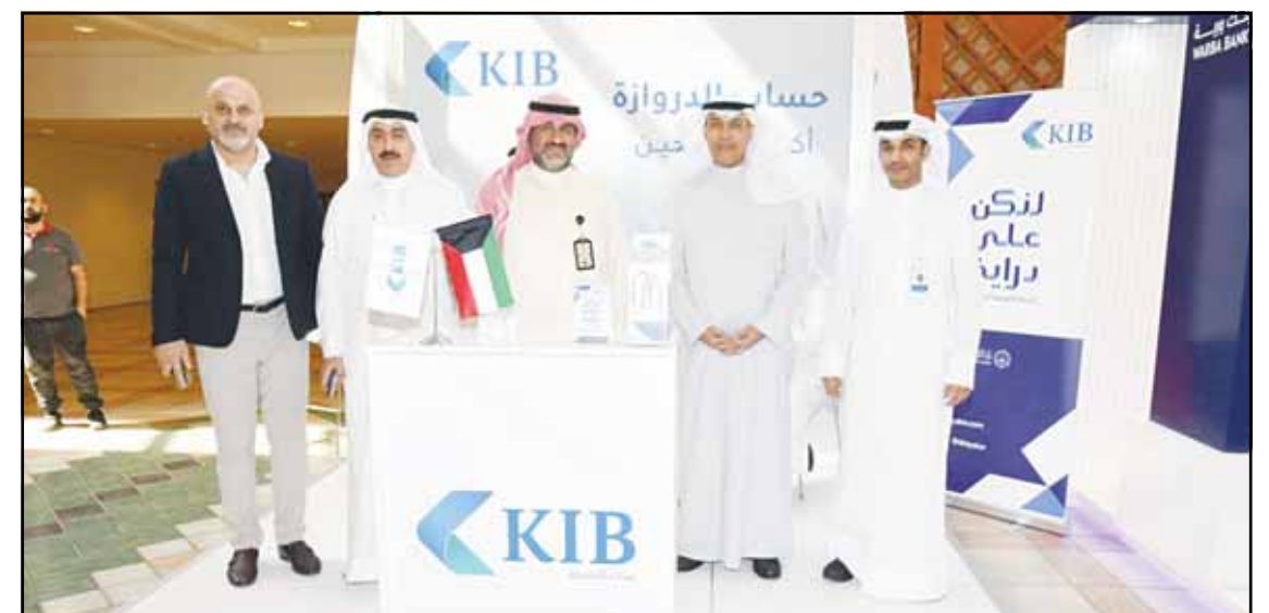
KIB booth at General Secretariat of the Council of Ministers.