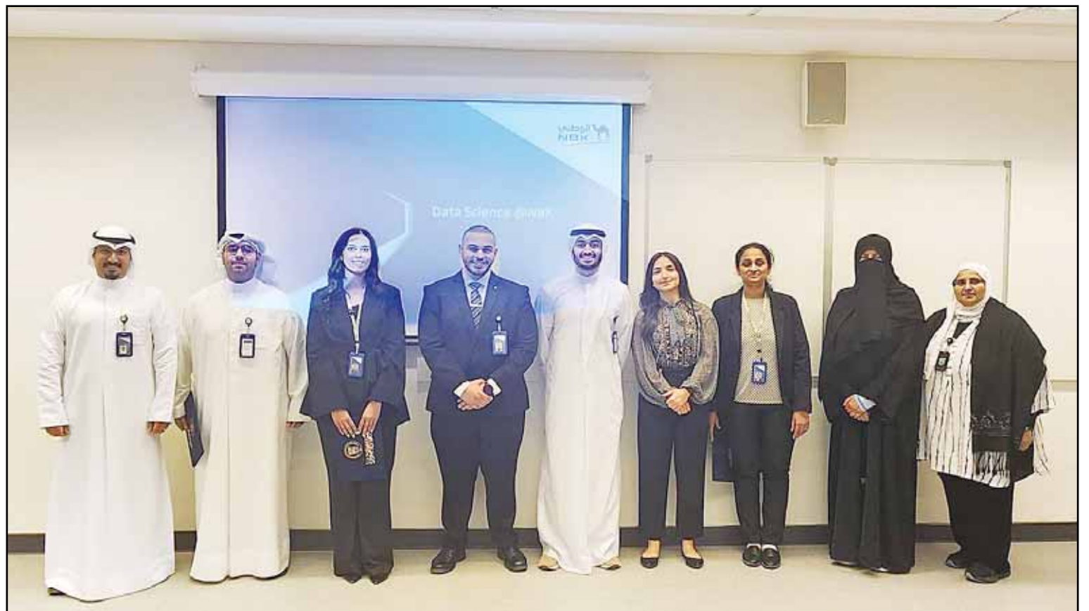
Group photo of participants during the workshop.

the crucial importance of developing and nurturing highly skilled talents in areas like information systems, data, computer science, and cyber-