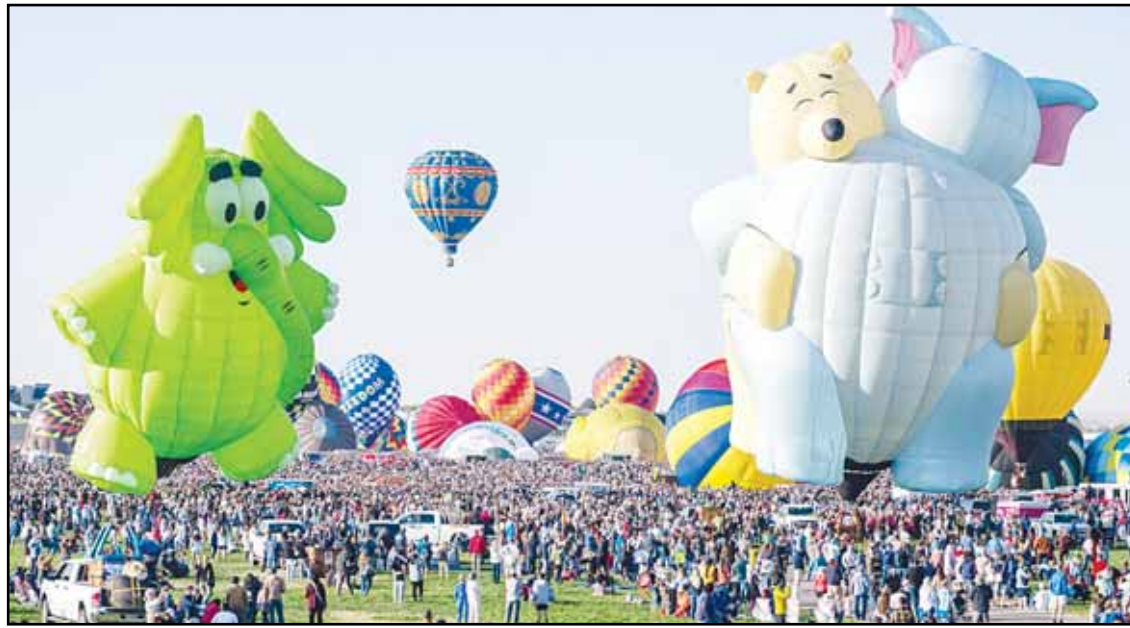
Hot air balloons take off during the mass ascension at the 52nd Albuquerque International Balloon Fiesta in Albuquerque, N.M., on Saturday, Oct. 5.