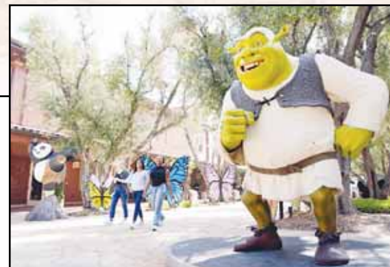
DreamWorks employees walk past statues of animated characters Shrek, from the 'Shrek' franchise, (right), and Po, from the 'Kung Fu Panda' franchise. (AP)