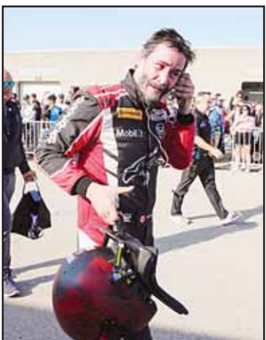
Keanu Reeves walks in the garage area following a GR Cup Series auto race.

He collaborated with a constellation of Greek music icons, including Nana Mouskouri, Vicky Leandros, Giannis Pouloupoulos, Marinella, and lyricist Lefteris Papadopoulos, shaping the landscape of Greek music. His work defied genre, blending traditional Greek music forms with elements of jazz and classical, creating an easy-on-the-ear signature sound - softer than the hard jangle of many of his contemporaries.