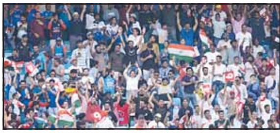
Indian fans cheer as Pakistan lost its first wicket during the ICC Women's T20 World Cup 2024 match between Pakistan and India at Dubai International Stadium, United Arab Emirates. — See Page 15