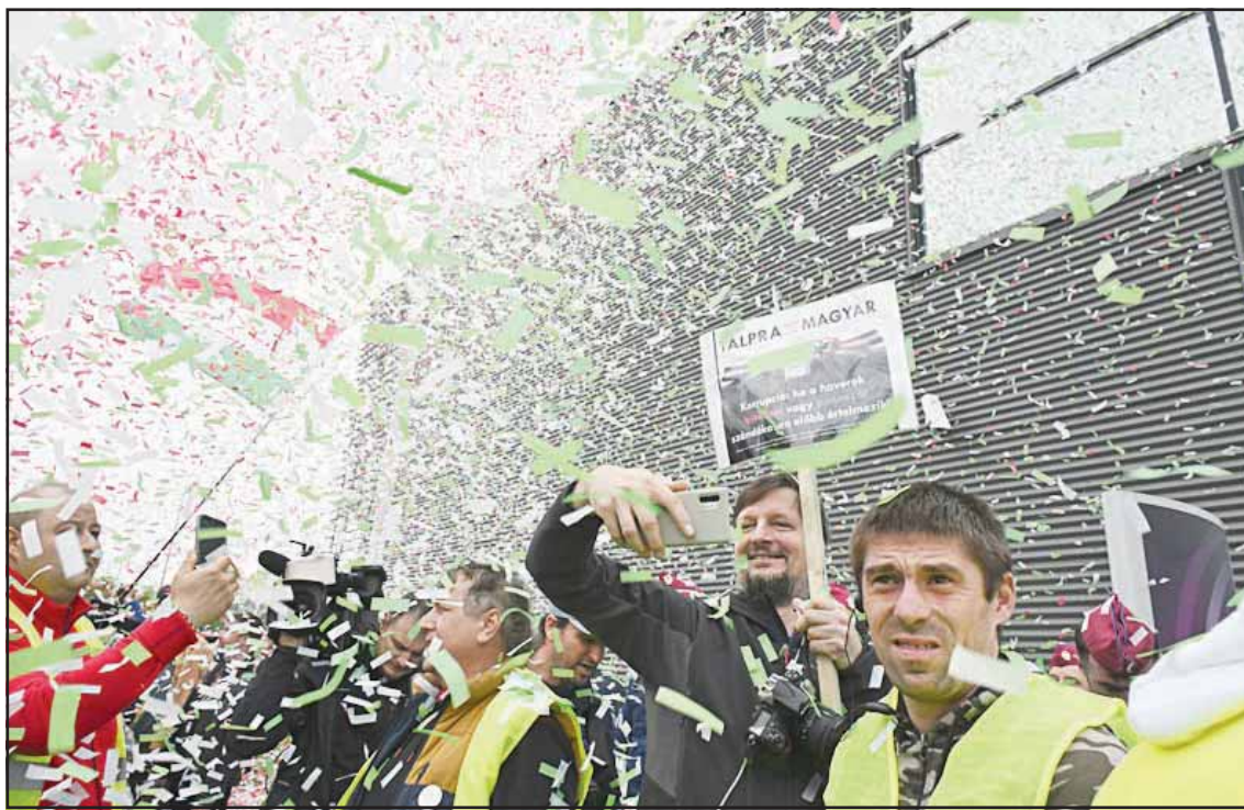
Participants attend a demonstration organised by the Hungarian opposition Tisza Party against public media at the MTVA headquarters in Budapest, Hungary on Oct 5.