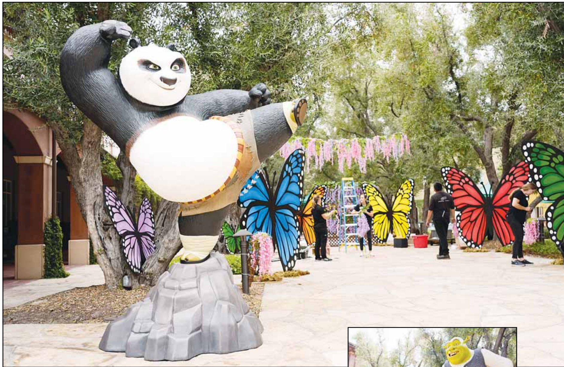
A statue of the animated character Po, from the 'Kung Fu Panda' films, stands on the DreamWorks Animation campus, Wednesday, Sept. 25, 2024, in Glendale, Calif.