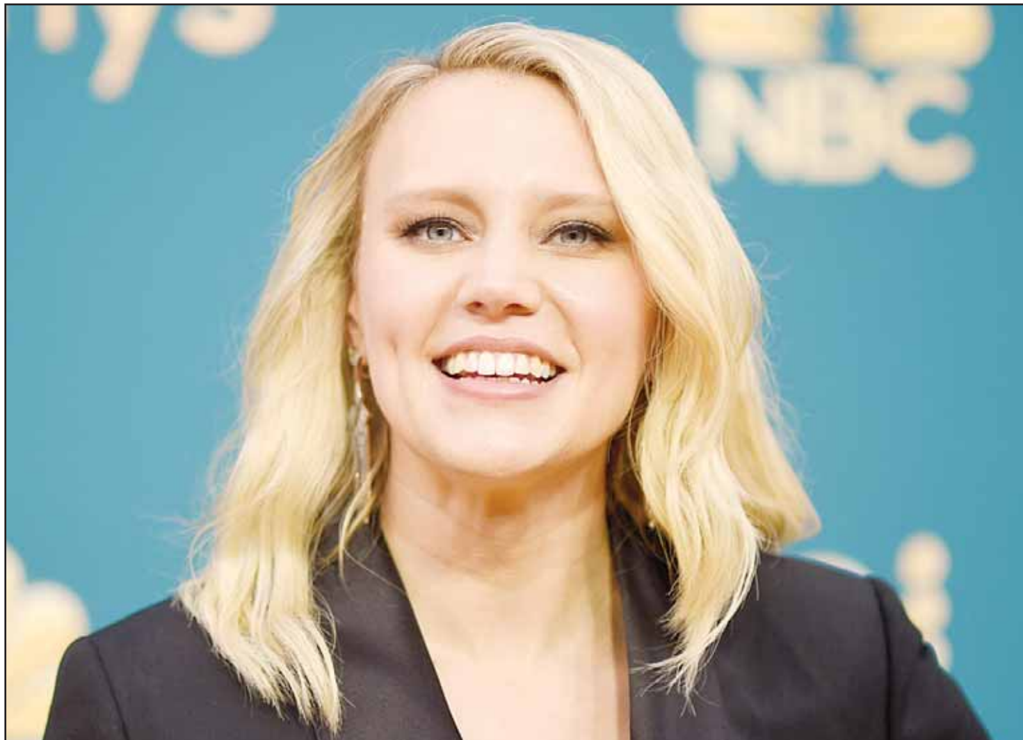
Kate McKinnon arrives at the 74th Primetime Emmy Awards on Monday, Sept. 12, 2022, at the Microsoft Theater in Los Angeles.