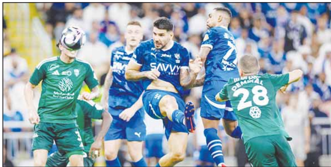
Players fighting for the ball during Al-Hilal and Al-Ahli match.