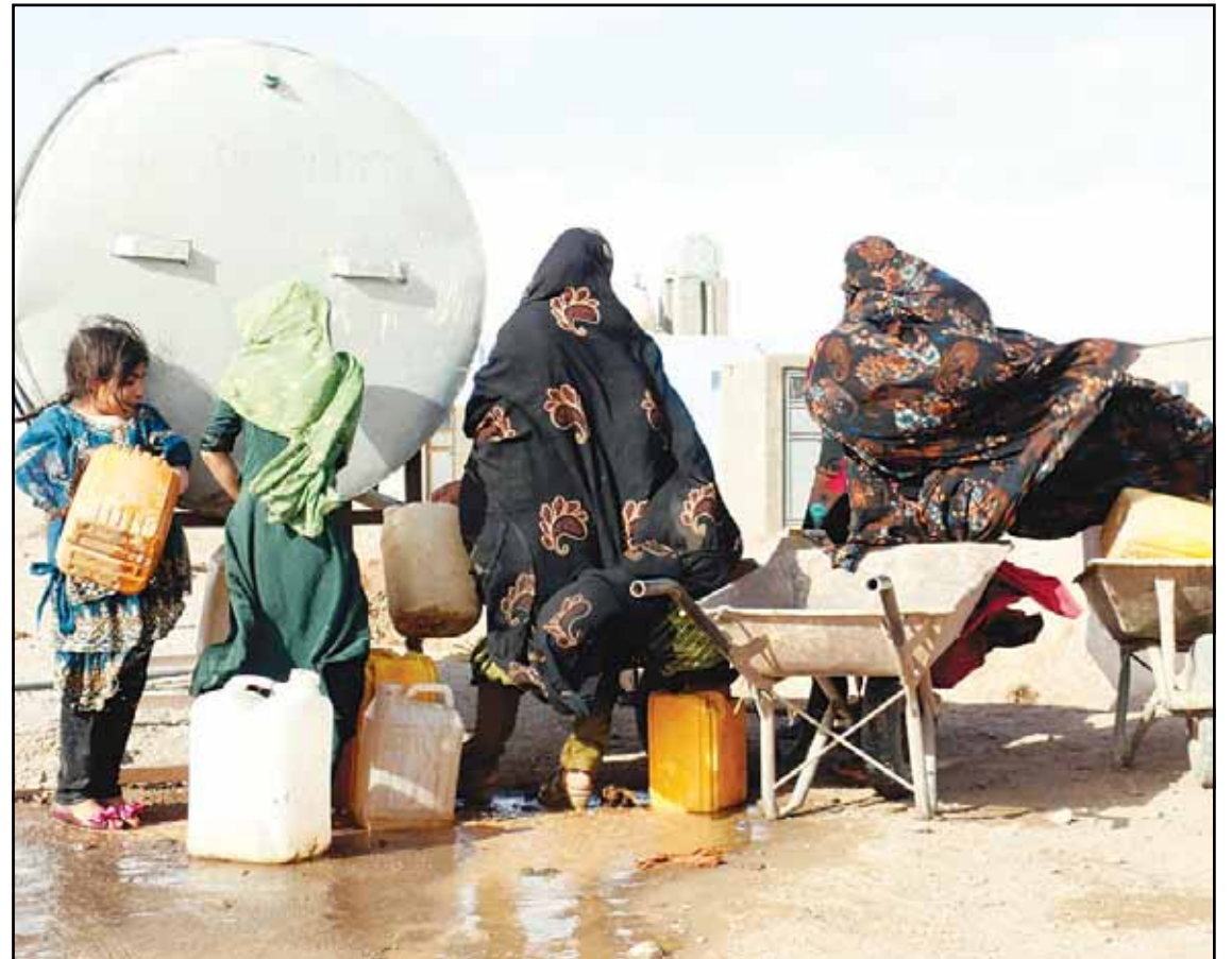
Survivors gather around a water tanker to get potable water in Zinda Jan district, of Herat province, in western Afghanistan on Sept. 28, 2024 following a 6.3 magnitude earthquake on Oct 7, 2023.

The International Rescue Committee set up feeding corners after the earthquake so mothers could safely breast-feed children and get nutrition counseling. The relief agency said it also fixed water systems, provided emergency cash, hygiene kits, medical and mental health support to tens of thousands of people.