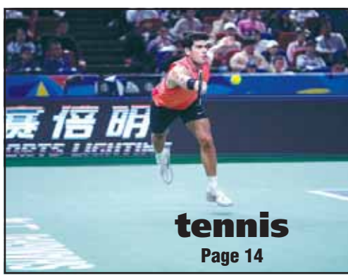
tennis Page 14