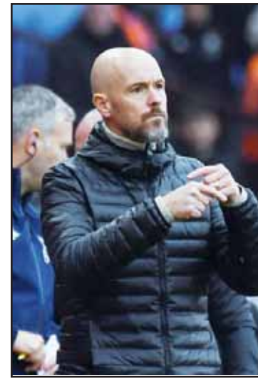
Manchester United's head coach Erik ten Hag gives instructions to his players during the English Premier League soccer match between Aston Villa and Manchester United, at Villa Park in Birmingham, England.

rest of United's hierarchy, the visitors came closest to scoring when Bruno