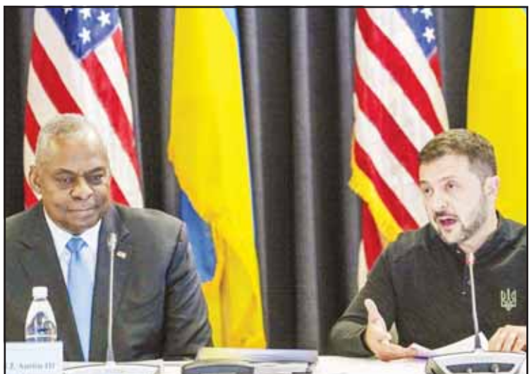
US Defense Secretary Lloyd Austin, left, listens to Ukraine's President Volodymyr Zelenskyy during a meeting at Ramstein Air Base in Ramstein-Miesenbach, Germany on Sept 6.

"They demonstrate what Ukrainians are capable of when they have enough weapons and sufficient range," he said in a statement on social media. "We will keep convincing our partners that our drones alone are not enough. More decisive steps are needed - and the end of this war will be closer."