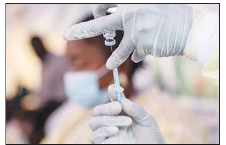
A nurse prepares to administer a vaccine against mpox, at the General hospital, in Goma, Democratic Republic of Congo Saturday, Oct. 5.

As part of the initiative, from October 21-27, F45 will take it's awareness and educational efforts up a notch by partnering with Battle Cancer - an organization that raises awareness and funds for cancer charities through epic fitness experiences - to offer members the chance to participate in and donate to a special . As a global F45 team, members will work together to hit a combined 20-million-point target, representing the 20 million people who are diagnosed globally with cancer each year.