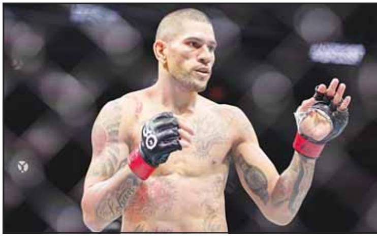
In this file photo, Alex Pereira fights against Israel Adesanya in a middleweight title match during UFC 287 at the Kaseya Center in downtown Miami.

Juliana Peña defeated Raquel Pennington via split decision (48-47, 47-48, 48-47) to reclaim the women's bantamweight crown in a bout billed as the co-main event. Peña originally held the crown after defeating Amanda Nunes at UFC 269 in 2021 and then lost it to Nunes in a rematch at UFC 277 in 2022.