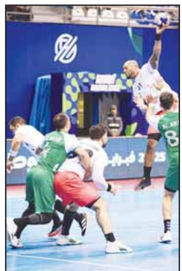
Players battling for the ball.