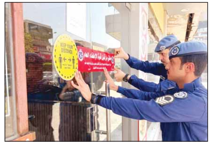
Fire force personnel sealing one of the shops.

While patrolling the area, the officers got suspicious of the expatriate, who was walking near a famous restaurant, because he fled upon sensing police presence. The officers chased and searched him, leading to the discovery of a bag containing narcotics.