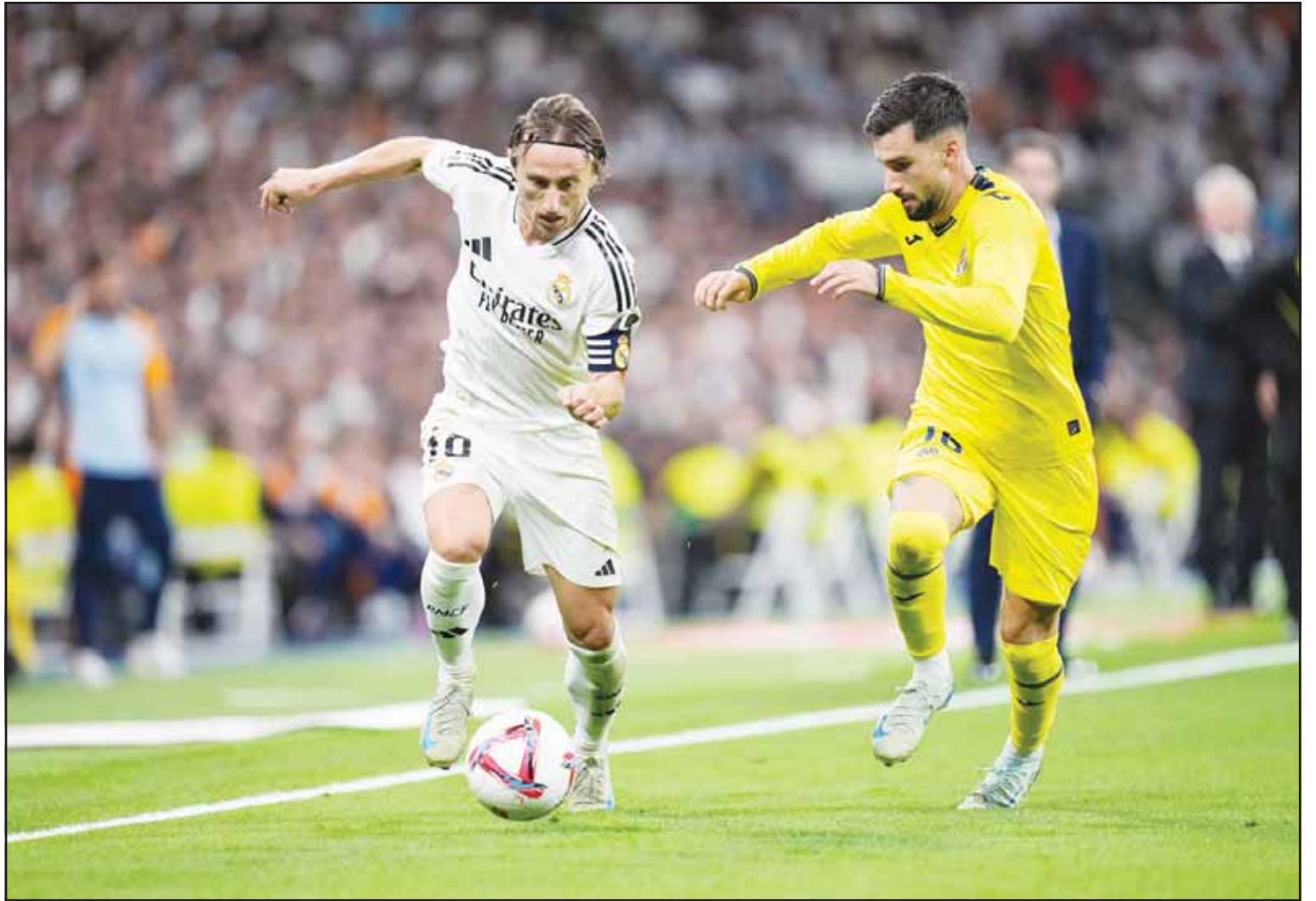
Real Madrid's Luka Modric, left, and Villarreal's Alex Baena fight for the ball during the La Liga soccer match between Real Madrid and Villarreal in Madrid, Spain.

Celta held on despite playing two men down to the end of the match. Borja Iglesias scored a 28th-minute winner in the visitor's only attempt on goal. The result ended a three-game winless streak for Celta.