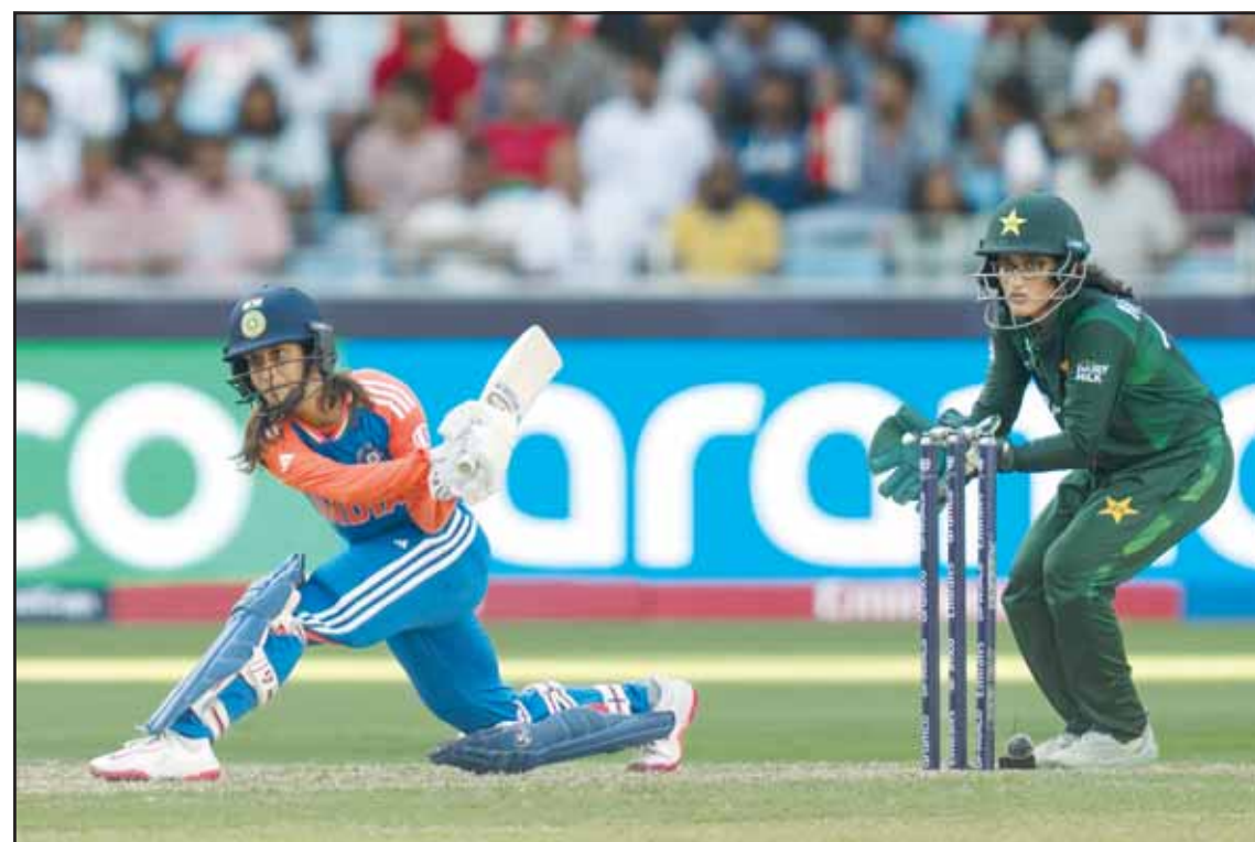
India's Jemimah Rodrigues plays a shot during the ICC Women's T20 World Cup 2024 match between Pakistan and India at Dubai International Stadium, United Arab Emirates.

Sana (2-23) picked up two late wickets off successive balls when Jemimah Rodrigues (23) and Gosh both were caught behind. Sana came close to have Deepti Sharma lbw in her final over but the on-field decision was overturned by the third umpire when TV replays suggested the batter had got a thick inside edge.