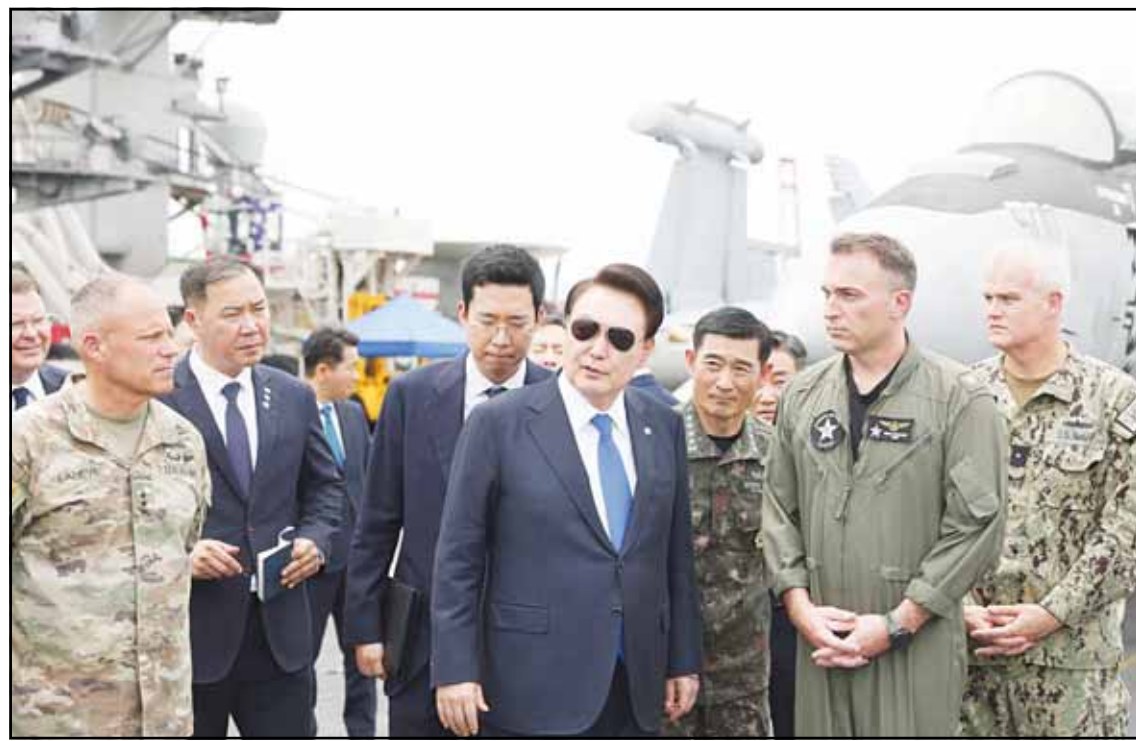
South Korean President Yoon Suk Yeol, (center), boards the USS Theodore Roosevelt aircraft carrier at the South Korean naval base in Busan, South Korea on June 25.