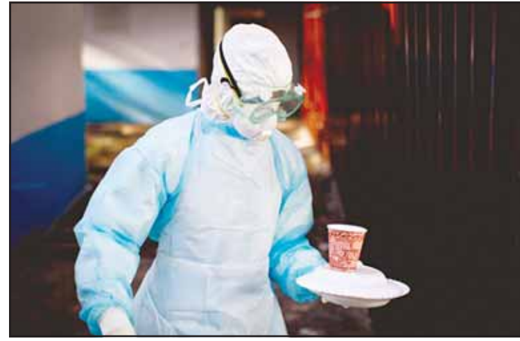
In this Oct. 8, 2014 photo, a medical worker from the Infection Prevention and Control unit wearing full protective equipment carries a meal to an isolation tent housing a man being quarantined after coming into contact in Uganda with a carrier of the Marburg virus, at the Kenyatta National Hospital in Nairobi, Kenya.

In a statement, Sabin Vaccine Institute said it had "entered into a clinical trial agreement with the Rwanda Biomedical