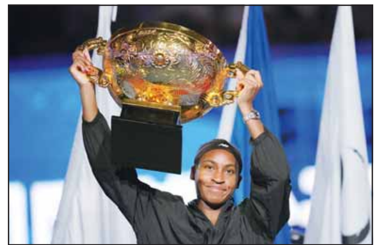
Coco Gauff of the United States celebrates with the championship trophy after defeating Karolina Muchova of Czech Republic in the women's singles final match at the China Open tennis tournament at the National Tennis Center in Beijing.

Second-ranked Carlos Alcaraz, who won the China Open on Wednesday for his fourth title of the year, defeated Chinese player Wu Yibing 7-6 (5), 6-3.