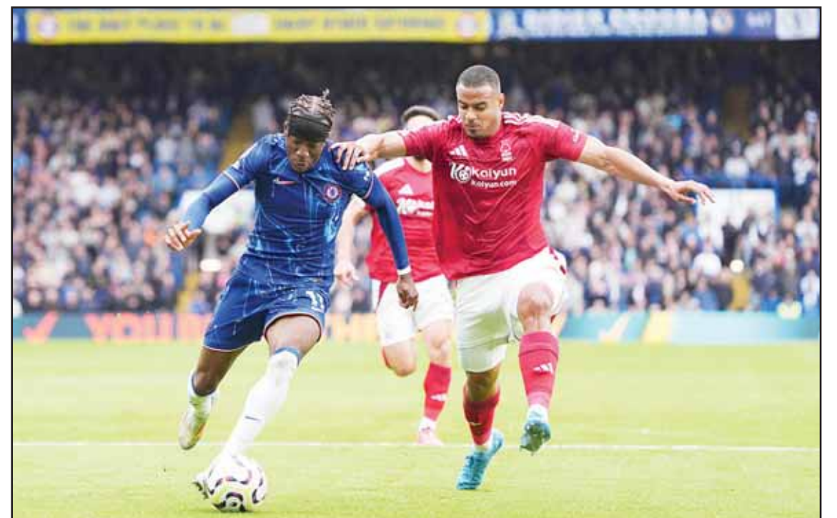
Chelsea's Noni Madueke and Nottingham Forest's Murillo, right, fight for the ball during the English Premier League soccer match between Chelsea and Nottingham Forest at Stamford Bridge in London.

Forest took the lead eight minutes earlier through Chris Wood and had to play with 10 men from the 78th after James Ward-Prowse's sending-off after a second yellow card for diving on the ball with his hands to stop Nicolas Jackson launching a breakthrough.