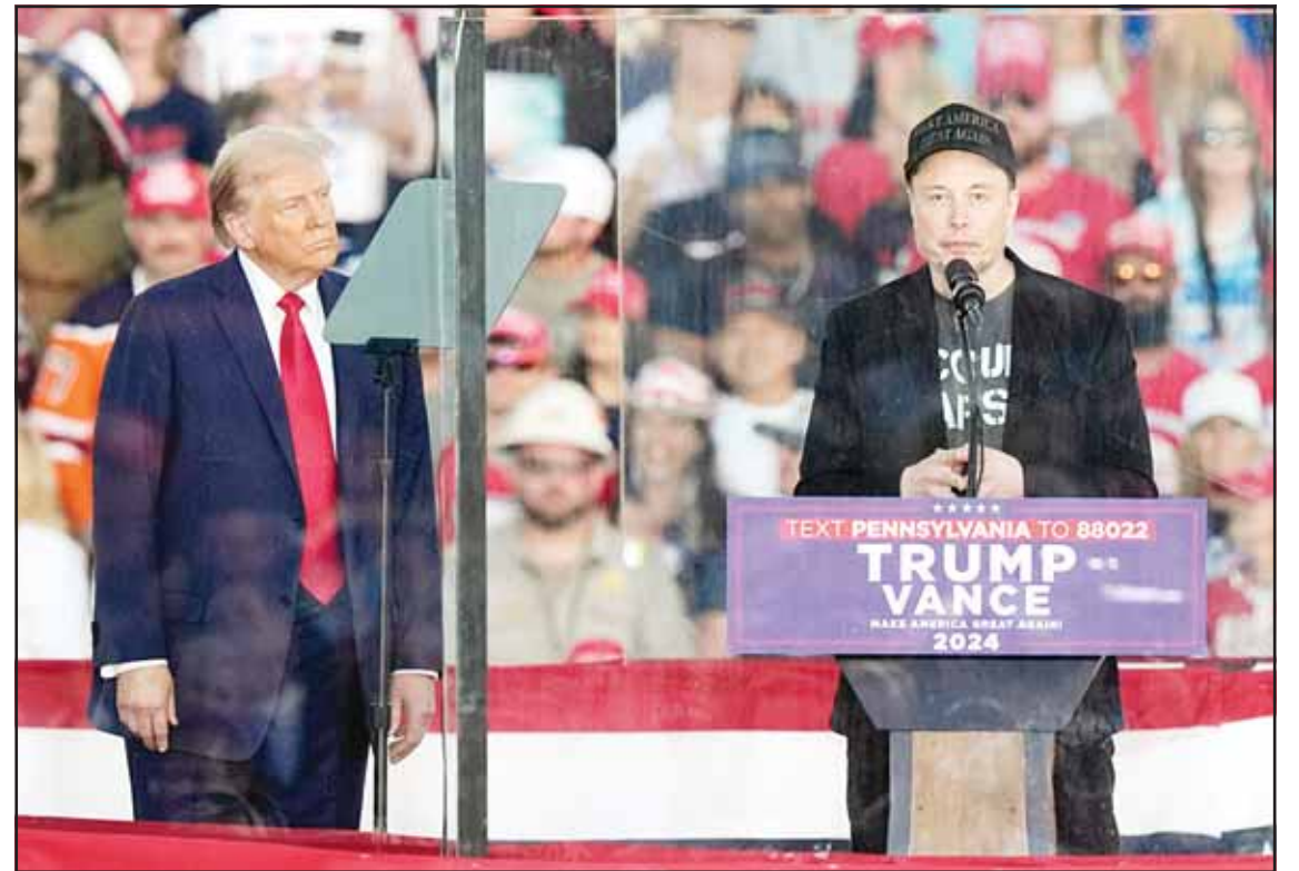
Republican presidential nominee former US president Donald Trump listens as Elon Musk speaks during a campaign rally at the Butler Farm Show on Oct 5 in Butler, Pa.

"You heard the shots. You saw the blood. We all feared the worst. But you knew everything would be OK when President Trump raised his fist high in the air and shouted, 'Fight, fight!'" said Vance, who was chosen as his vice presidential nominee less than two days later.