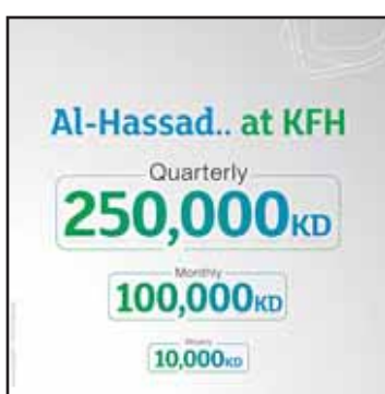
KFH Al-Hassad winners.

As for the eligibility criteria, the customer must hold the balance for a period of 15 days for an opportunity to enter the draws. The customer will have one chance for every KD 50. If