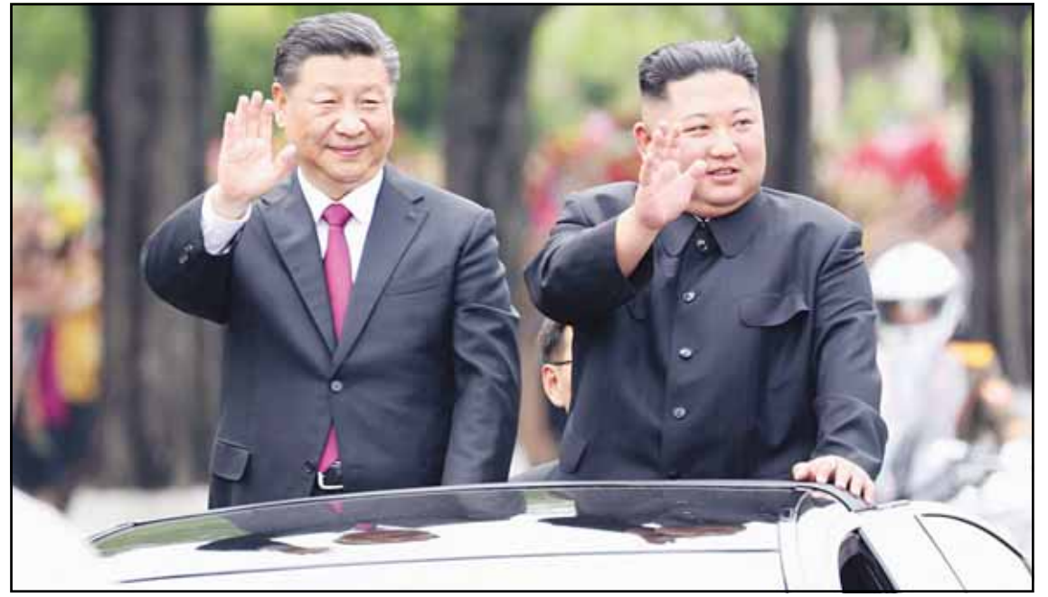
In this photo released by China's Xinhua News Agency, visiting Chinese President Xi Jinping, (left), and North Korean leader Kim Jong Un wave from an open top limousine as they travel along a street in Pyongyang, North Korea, on June 20, 2019.

On Sunday, KCNA reported that Kim oversaw a live artillery firing drill by cadets of a military academy. After watching the drill, Kim said training programs at the military academy must focus on "the guerrilla war tactics to wipe out the enemies through rapid mobile and surprise operations," according to KCNA.