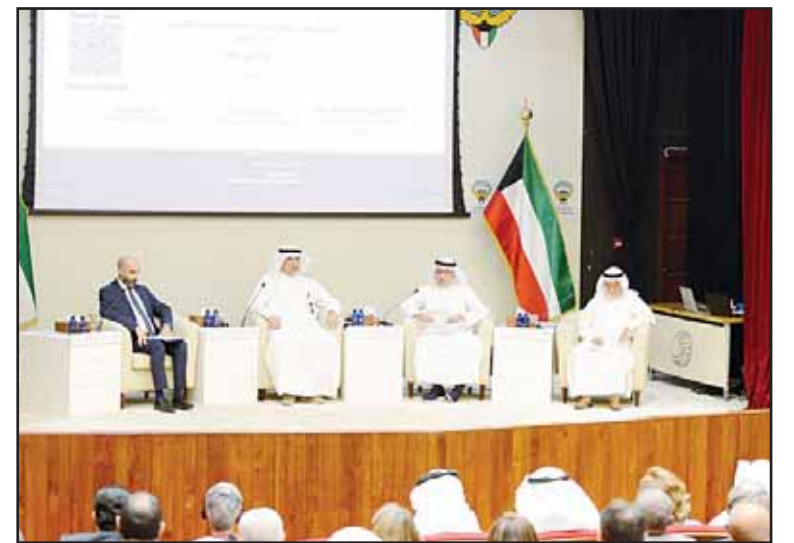
Symposium on Gaza held at the Saud Al-Nasser Al-Sabah Kuwaiti Diplomatic Institute.