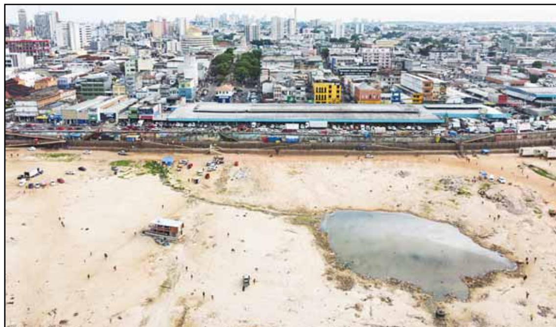
A part of the Negro River is dried up at the port in Manaus, Amazonas state, Brazil on Oct 4 amid severe drought.