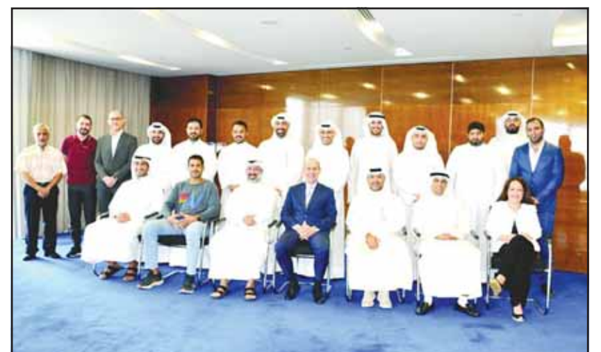
Participants pose for a group photo during a seminar on Algorithmic Trading.