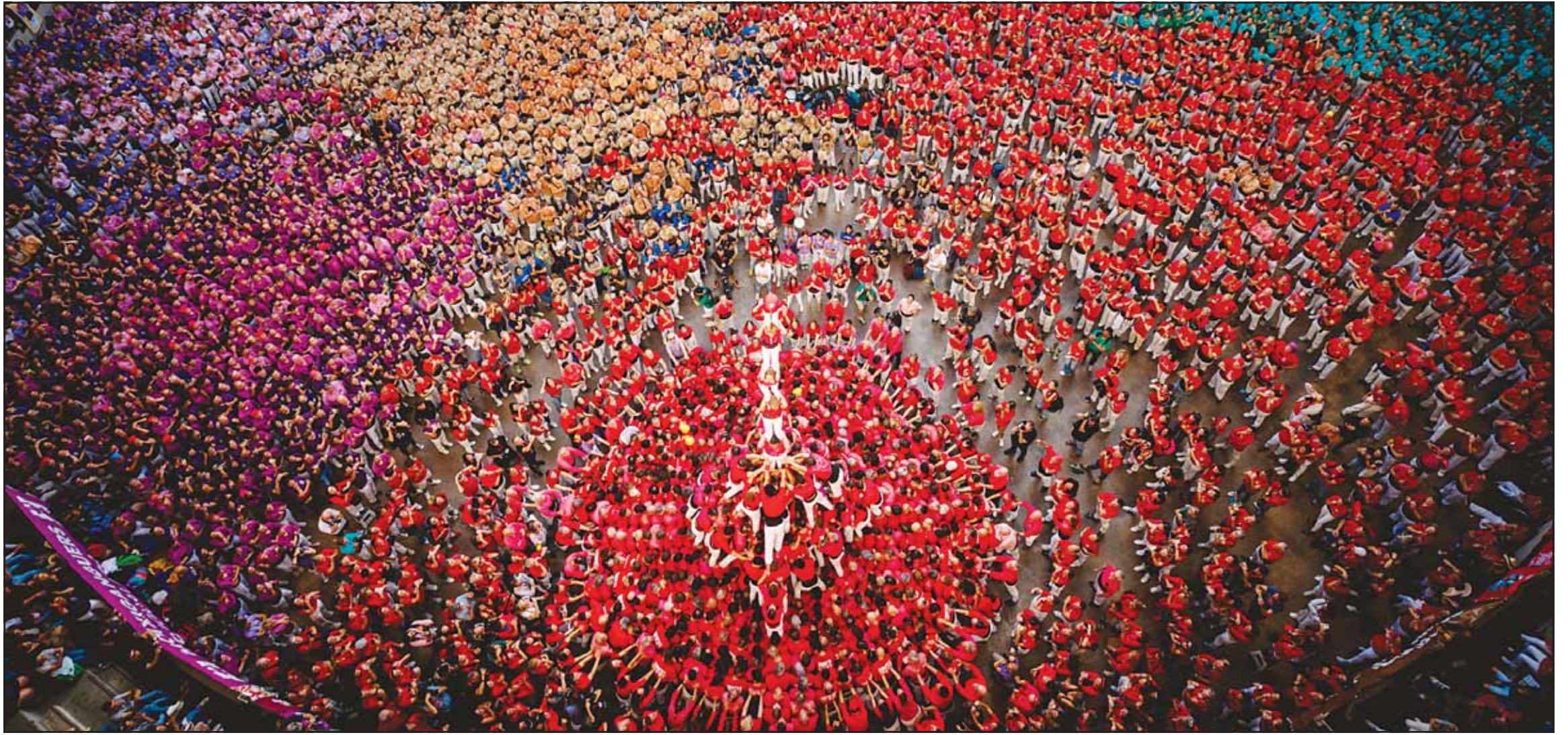
Members of 'Colla Joves Xiquets de Valls' form a 'Castell' or human tower, during the 29th Human Tower Competition in Tarragona, Spain on Oct 6.

'As you can see I am not just MAGA – I am Dark MAGA'