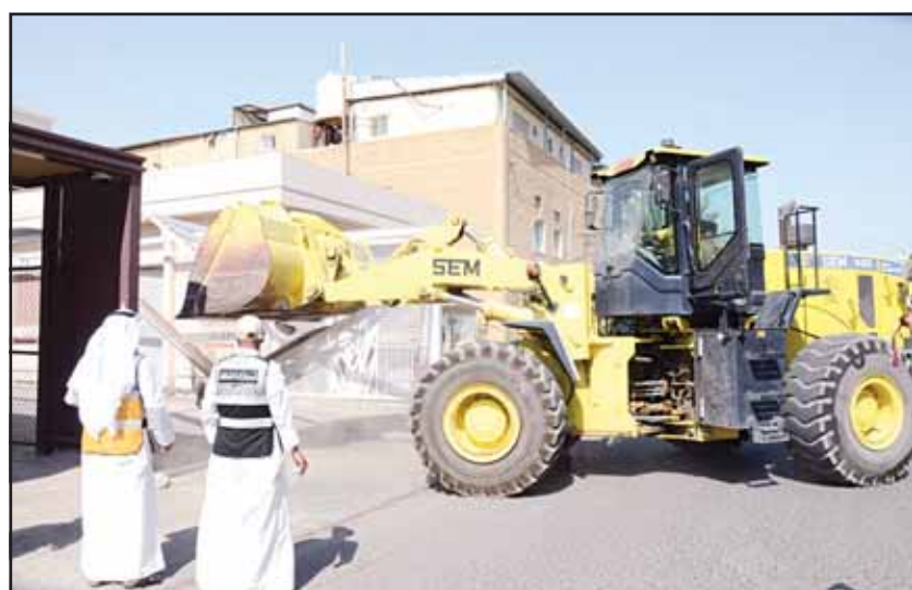
Kuwait Municipality officials conduct demolition of one of the encroachments.