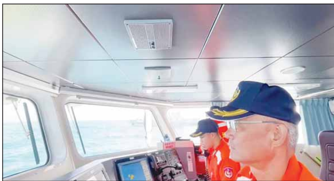
In this screen grab from video released by the Taiwan Coast Guard, Taiwan Coast Guard members track China's Coast Guard boat as it passed near the coast of Matsu islands, Taiwan on Oct 14.

Taiwan remained defiant. "Our military will definitely deal with the threat from China appropriately," Joseph