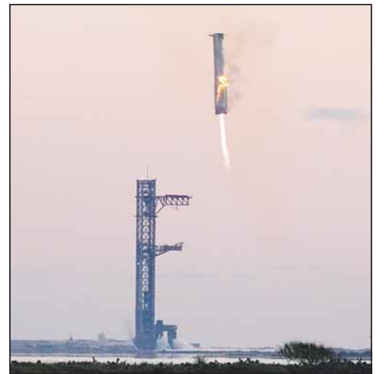
SpaceX's mega rocket booster returns to the launch pad to be captured during a test flight Sunday, Oct. 13, in Boca Chica, Texas.