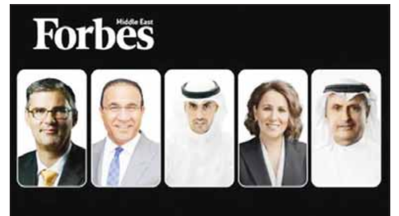
Five Kuwaiti figures make Forbes' Middle East list.

As a leading digital service provider, Zain believes in the importance of harnessing AI's potential to lead the digital transformation journey and foster digital innovation. The company continues to reinforce its efforts to further push AI-enabled innovative services and 5.5G network automation, as it strongly believes in the pivotal role AI tools and applications play in transforming networks, ultimately improving performance, efficiency, optimization, operations, and maintenance.