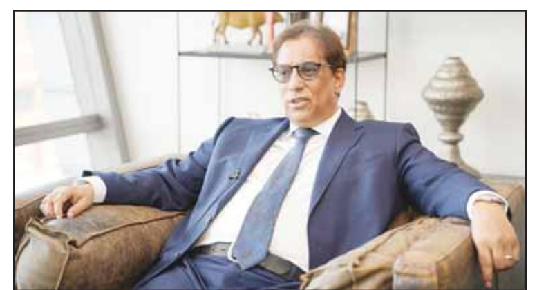
Iqbal Surve takes an interview with Xinhua in Cape Town, South Africa on Sept. 27.

The future of journalism, the veteran media leader argued, will focus