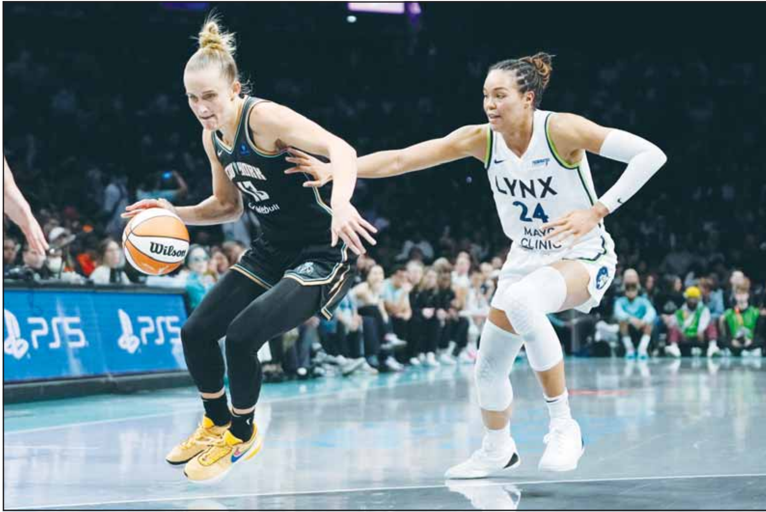
New York Liberty's Leonie Fiebich, left, dribbles against Minnesota Lynx's Napheesa Collier, right, during the first half in Game 2 of a WNBA basketball final playoff series in New York.