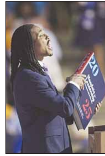
Pennsylvania State Rep Malcolm Kenyatta speaks during the Democratic National Convention on Aug 20, in Chicago.

DePasquale, who lives in Pittsburgh, said he would prioritize protect-