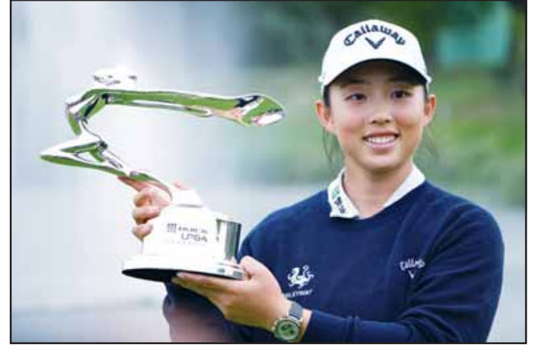
Ruoning Yin of China holds up her trophy for photos after winning the LPGA Shanghai golf tournament at China's Shanghai Qizhong Garden Golf Club.

Kelly was bogey-free until a three-putt from 40 feet on the final hole. Padraig Harrington, who started the final round with a three-shot lead, birdied the par-5 17th to tie for the lead. But he went long on the 18th, chipped 8 feet by and missed the par putt for a 71.