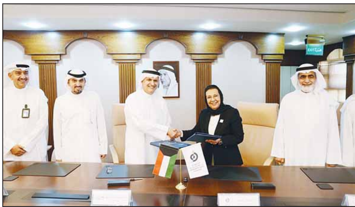
NBK and AASU officials shake hands after the signing of the agreement.

KUWAIT CITY, Oct 14: National Bank of Kuwait (NBK) signed a cooperation agreement with Abdullah AlSalem University (AASU) to exchange expertise between the two sides in various fields, in addition to sponsoring the university's different activities and events all year round.