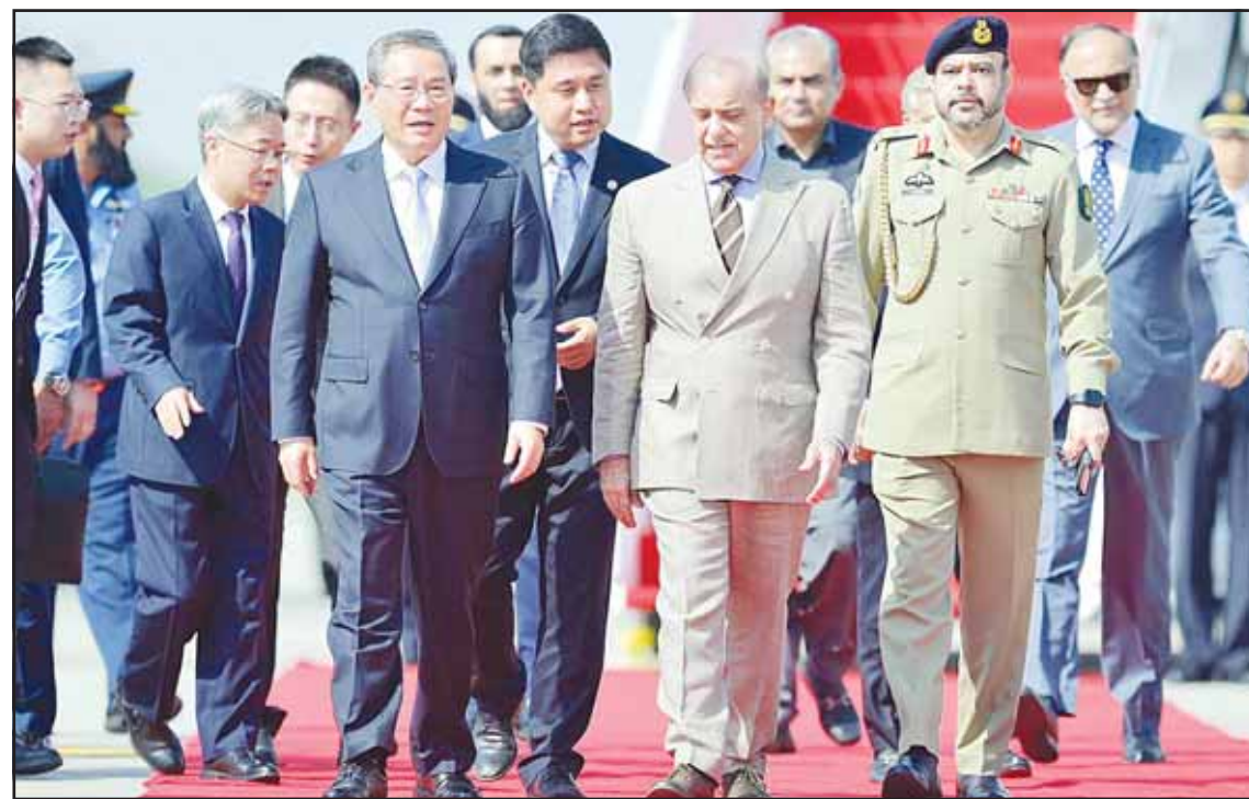
In this photo released by the Press Information Department, China's Premier Li Qiang, (third left), walks Pakistan's Prime Minister Shehbaz Sharif, (third right), upon his arrival at an airbase in Rawalpindi, Pakistan on Oct 14, 2024.

China held similar large-scale exercises around Taiwan and simulated a blockade in 2022 after a visit to the island by Nancy Pelosi, who was then speaker of the U.S. House of Representatives. China routinely states that Taiwan independence is a "dead end" and that annexation by Beijing is a historical inevitability. China's military has increased its encircling of Taiwan's skies and waters in the past few years, holding joint drills with its warships and fighter jets on a near-daily basis near the island.