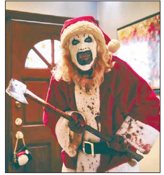
This image released by Cineverse Entertainment shows David Howard Thornton in a scene from 'Terrifier 3.'

Jason Reitman's "Saturday Night" failed to ignite its nationwide expansion. The film, with an ensemble cast led by Gabriel LaBelle's Lorne Michaels, collected $3.4 million from 2,288 locations.