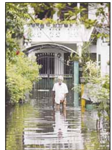
A man wades through water outside his flooded house in Colombo, Sri Lanka on Oct 13.

Sri Lanka has been grappling with severe weather conditions since May, mostly caused by heavy monsoon rains. In June, 16 people died due to floods and mudslides.