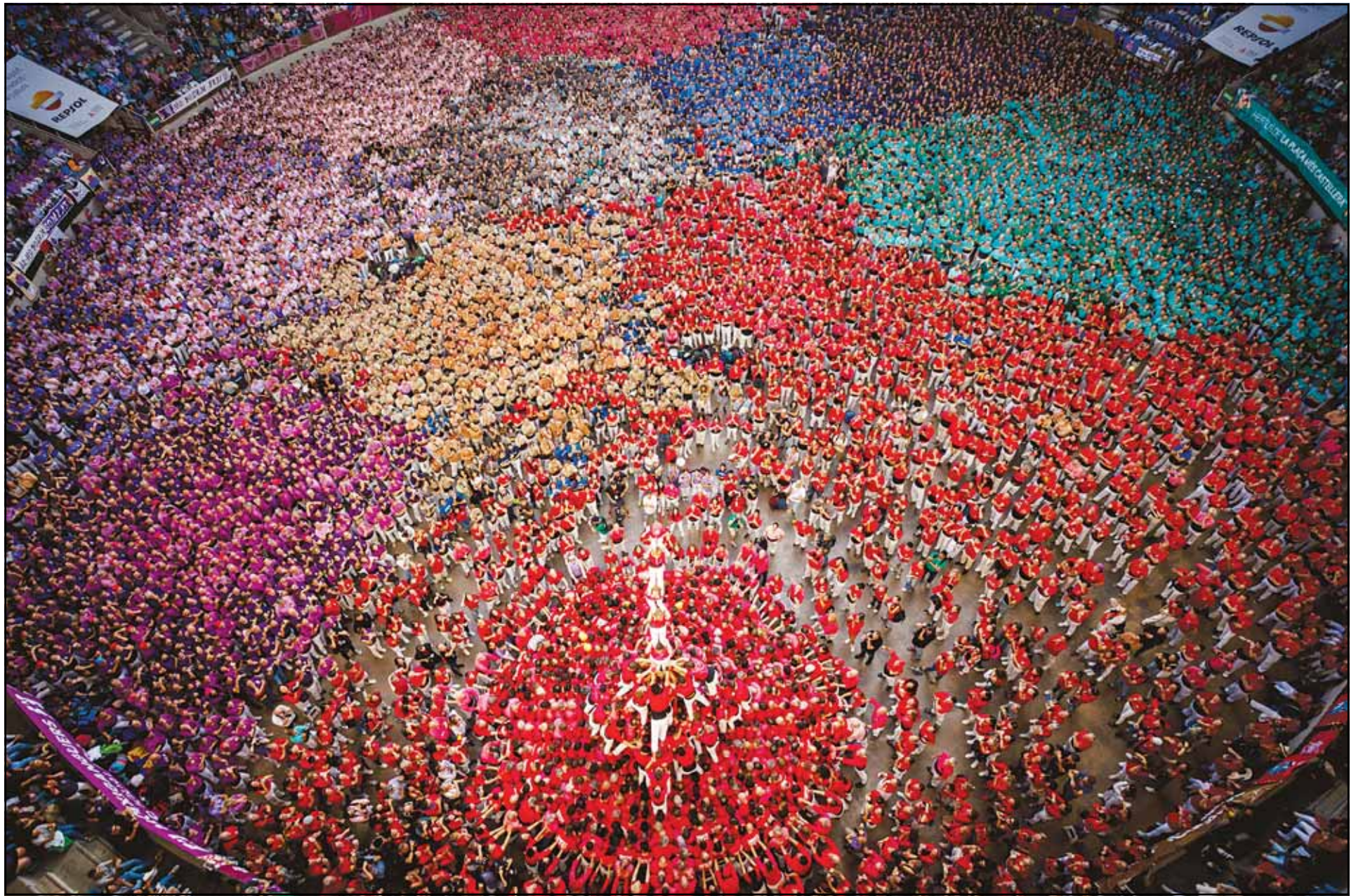
Members of ‘Colla Joves Xiquets de Valls’ form a ‘Castell’ or human tower, during the 29th Human Tower Competition in Tarragona, Spain, Sunday, Oct. 6.