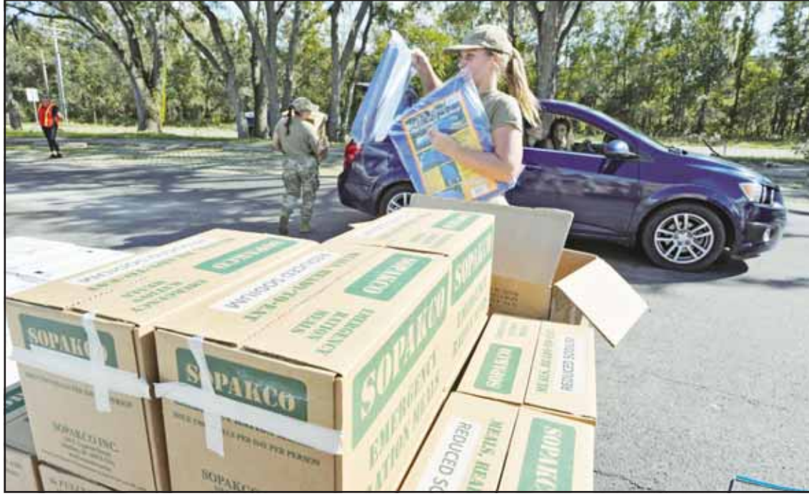
Members of the Florida Air National Guard load supplies into the cars of residents displaced by Hurricane Milton on Oct 13 at the Hillsborough Community College campus in Brandon, Fla.