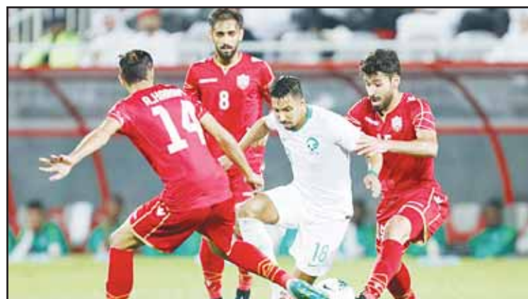
Players vie for the ball.

In Group A, Uzbekistan and Iran are top with seven points each. Iran will host fourth-place Qatar in Dubai, due to the security situation at home while Uzbekistan takes on the United Arab Emirates in third.