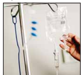
A nurse hooks up an IV to a flu patient at Upson Regional Medical Center in Thomaston, Ga., Feb. 9, 2018. (AP)

Another limitation to rapid antigen tests is that currently they are designed to test only for COVID-19, influenza A and influenza B. Currently available over-the-counter tests aren't able to detect illnesses from pathogens that look like these viruses and cause similar symptoms, such as adenovirus or strep. (AP)