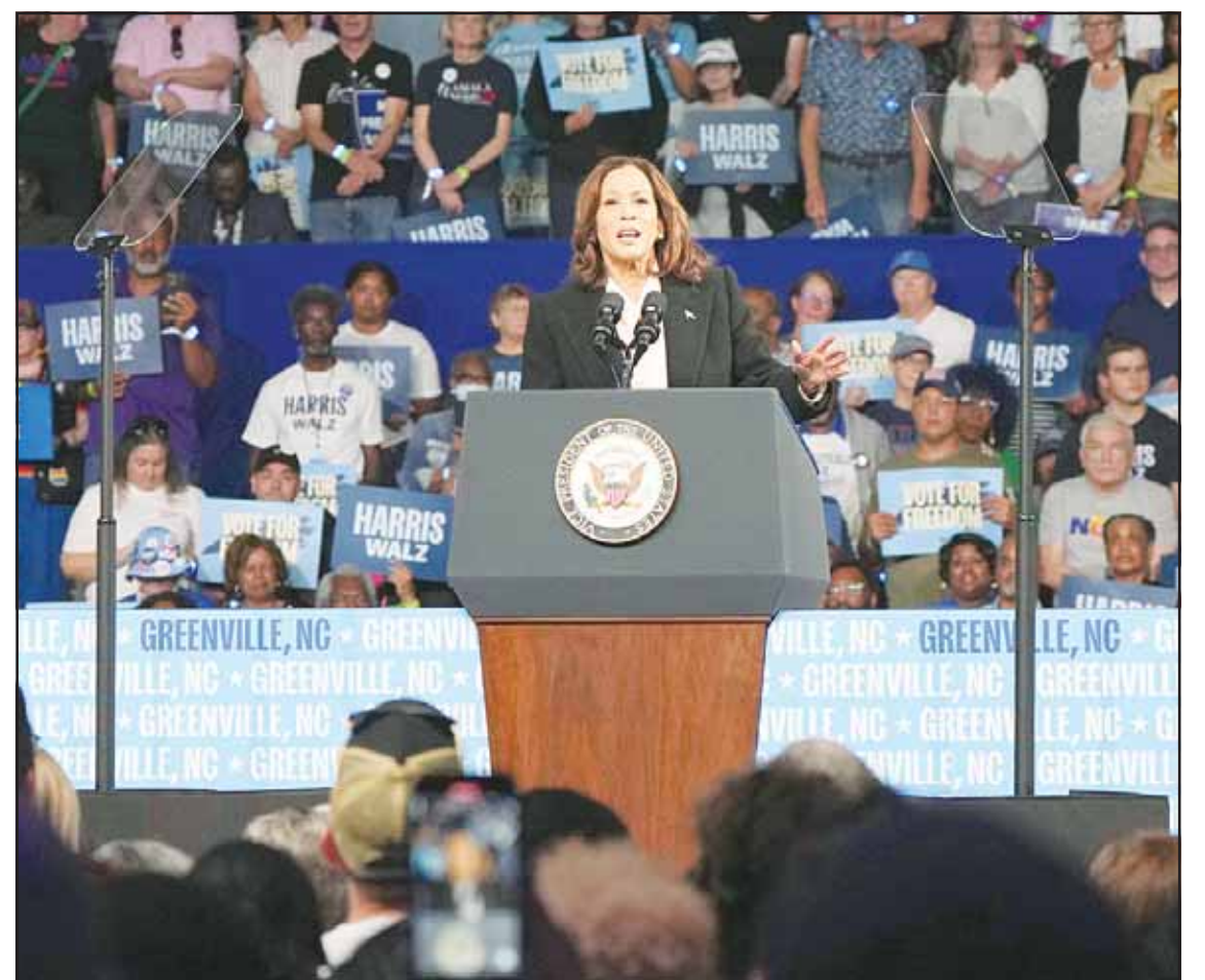
Democratic presidential nominee Vice President Kamala Harris speaks during a campaign event at East Carolina University on Oct 13, 2024, in Greenville, NC.

The Harris campaign also has been working to increase support among other male voting blocs, including Hispanics, by founding the group "Hombres con Harris," Spanish for "Men with Harris."