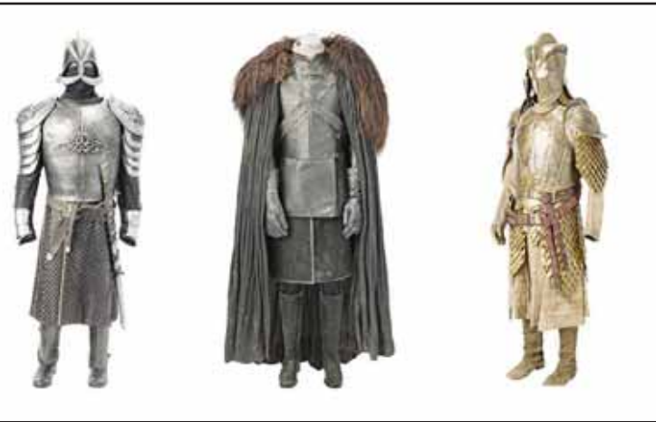
This combination of images released by Heritage Auctions shows costumes worn by characters from 'Game of Thrones,' from left, armor worn by Gregor 'The Mountain' Clegane, Jon Snow's Night's Watch ensemble, and Jaime Lannister's full Kingsguard armor.