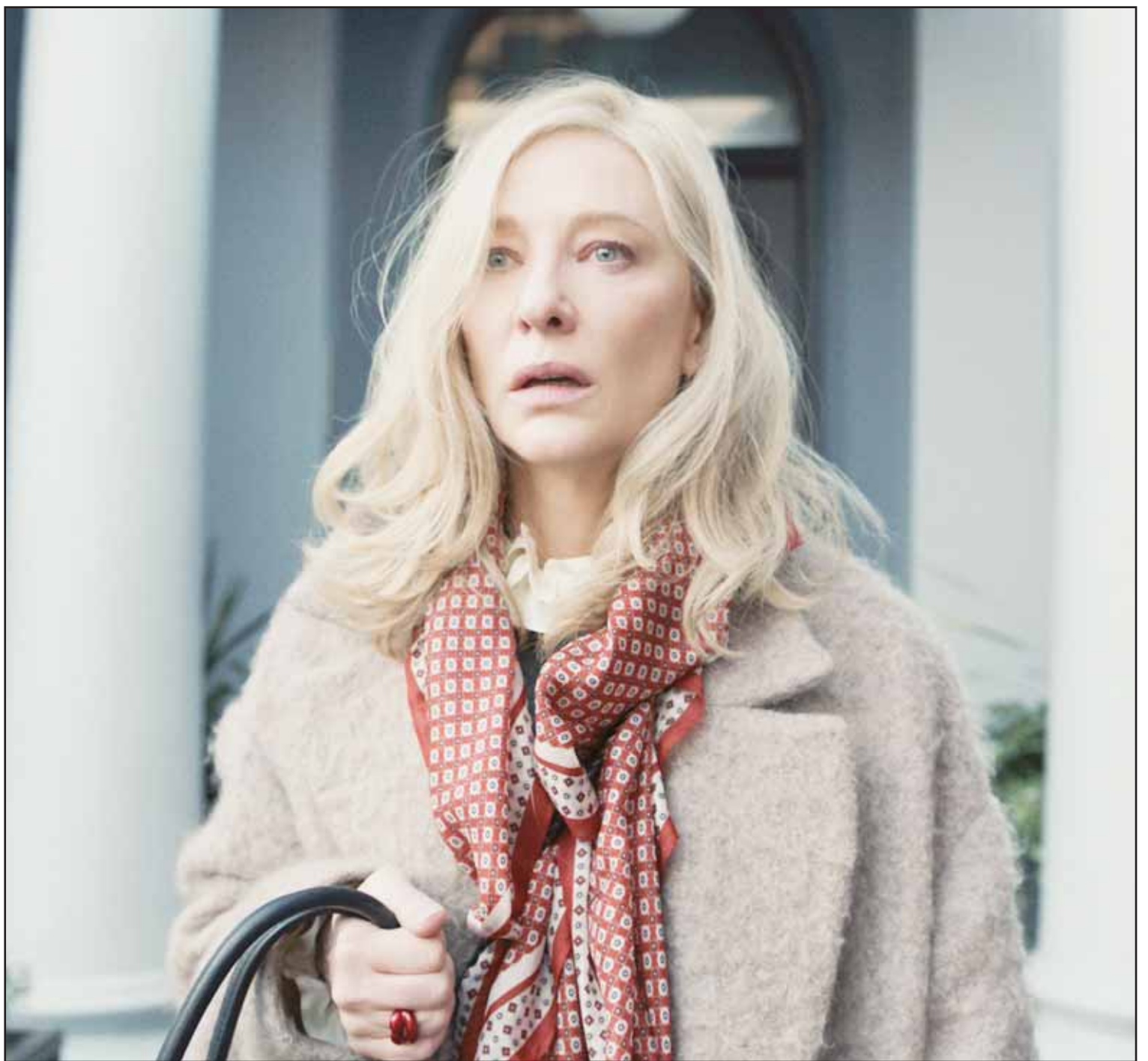
This image released by Apple TV+ shows Cate Blanchett in a scene from 'Disclaimer.' (AP)