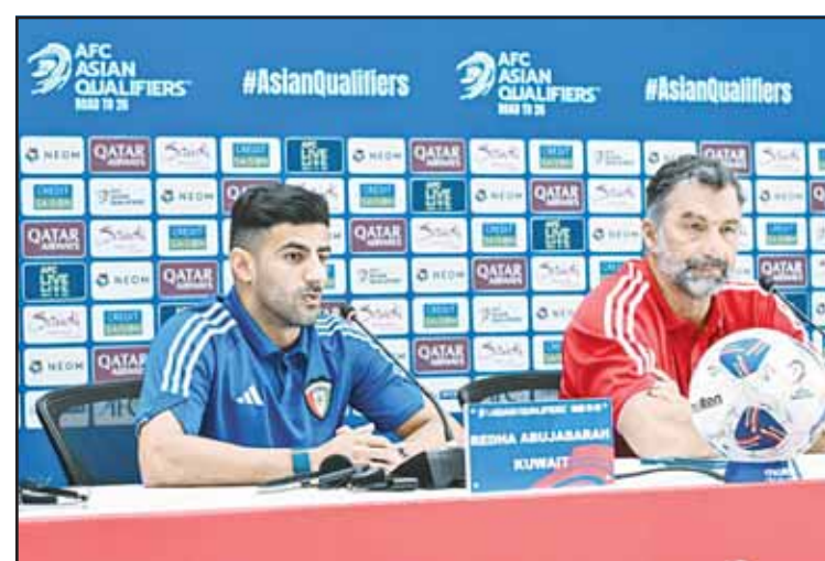
Kuwaiti player and coach Pizzi address the media during a press conference.