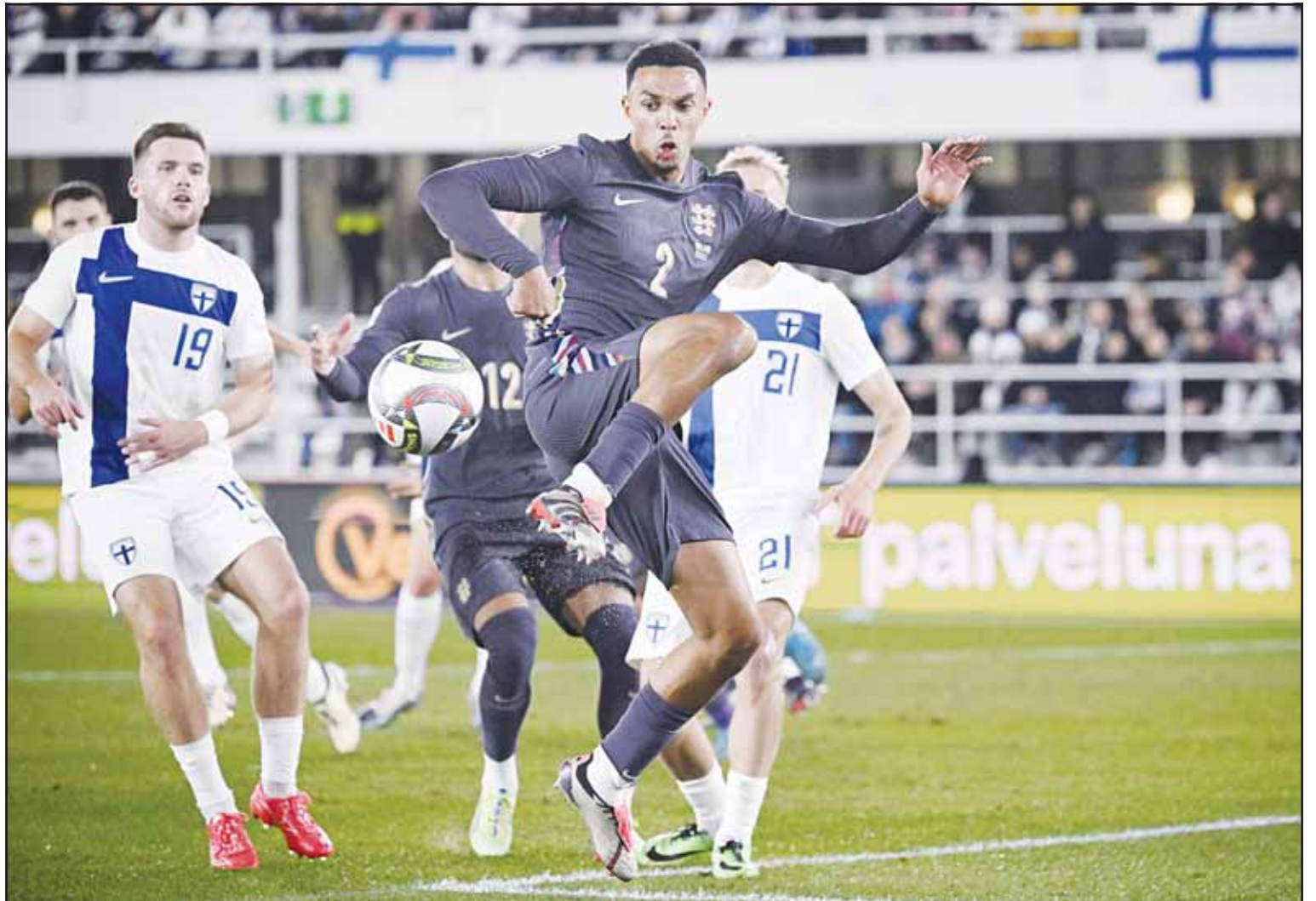
England's Trent Alexander-Arnold, centre, controls the ball during the UEFA Nations League soccer match between Finland and England, at the Olympic Stadium in Helsinki, Finland.

Norway still leads the group but is level on seven points with Austria in second and third-place Slovenia, which beat Kazakhstan 1-0.