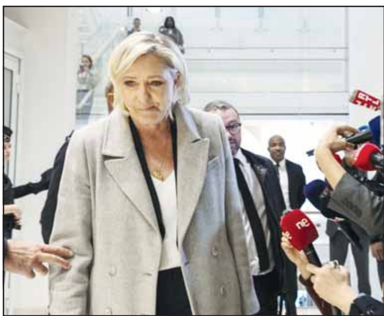
French far-right leader Marine Le Pen walks past the media as she arrives at the court house in Paris on Sept 30.

Following the new appointment, Pellegrini said that the health ministry is the department where ministers have changed most frequently since Slovakia became independent on Jan. 1, 1993.