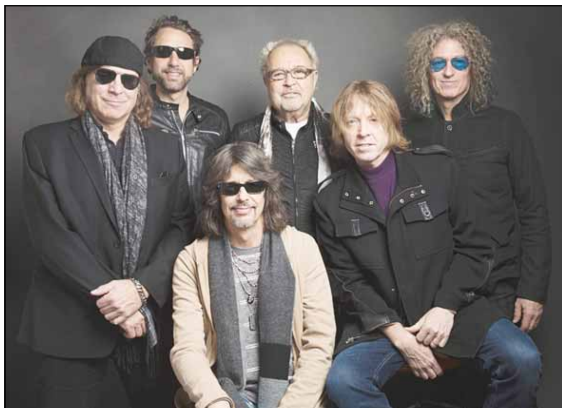
Thom Gimbel, (from left), Michael Bluestein, Mick Jones, Kelly Hansen, Jeff Pilson and Bruce Watson of Foreigner pose for a portrait during the Sundance Film Festival in Park City, Utah on Jan. 20, 2017.

Willis urgently left to fly home to London to help care for his two young children, who were suffering from whooping cough and chickenpox, and woke up to a phone call that he was in the band. He got on the next flight to New York and straight into the studio for “Head Games.”