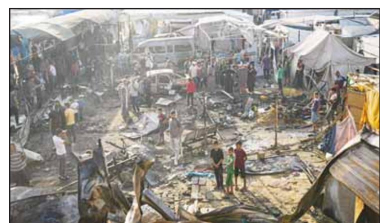
Palestinians look at the damage after an Israeli strike hit a tent area in the courtyard of Al Aqsa Martyrs hospital in Deir al Balah, Gaza Strip, Monday, Oct. 14, 2024.

There was no immediate comment from the Israeli military and it was not clear what the target was. The strike hit a small apartment building in the village of Aito, far from the Hezbollah