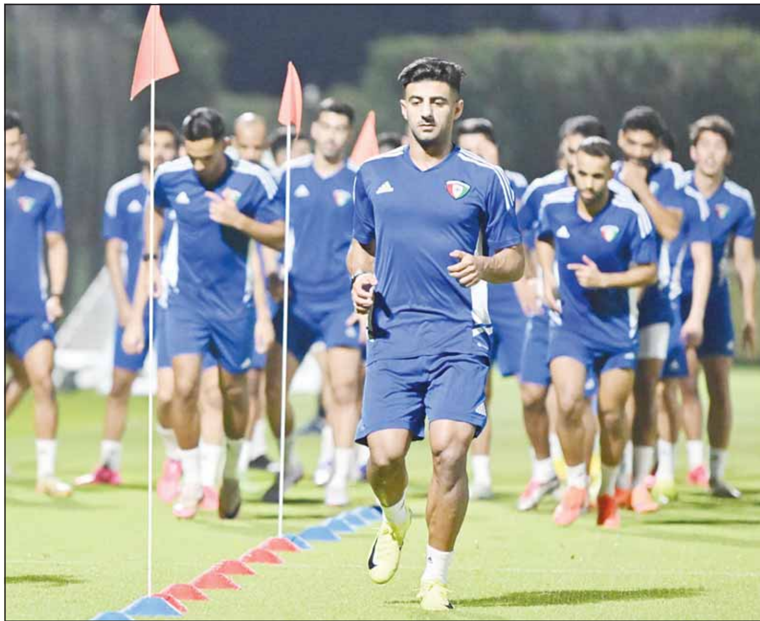
Players hold their final training session for the World Cup qualifier against Palestine.

ment reflects the hard work and dedication put into both the race and the preparation leading up to it, including psychological and physical training for the championship.