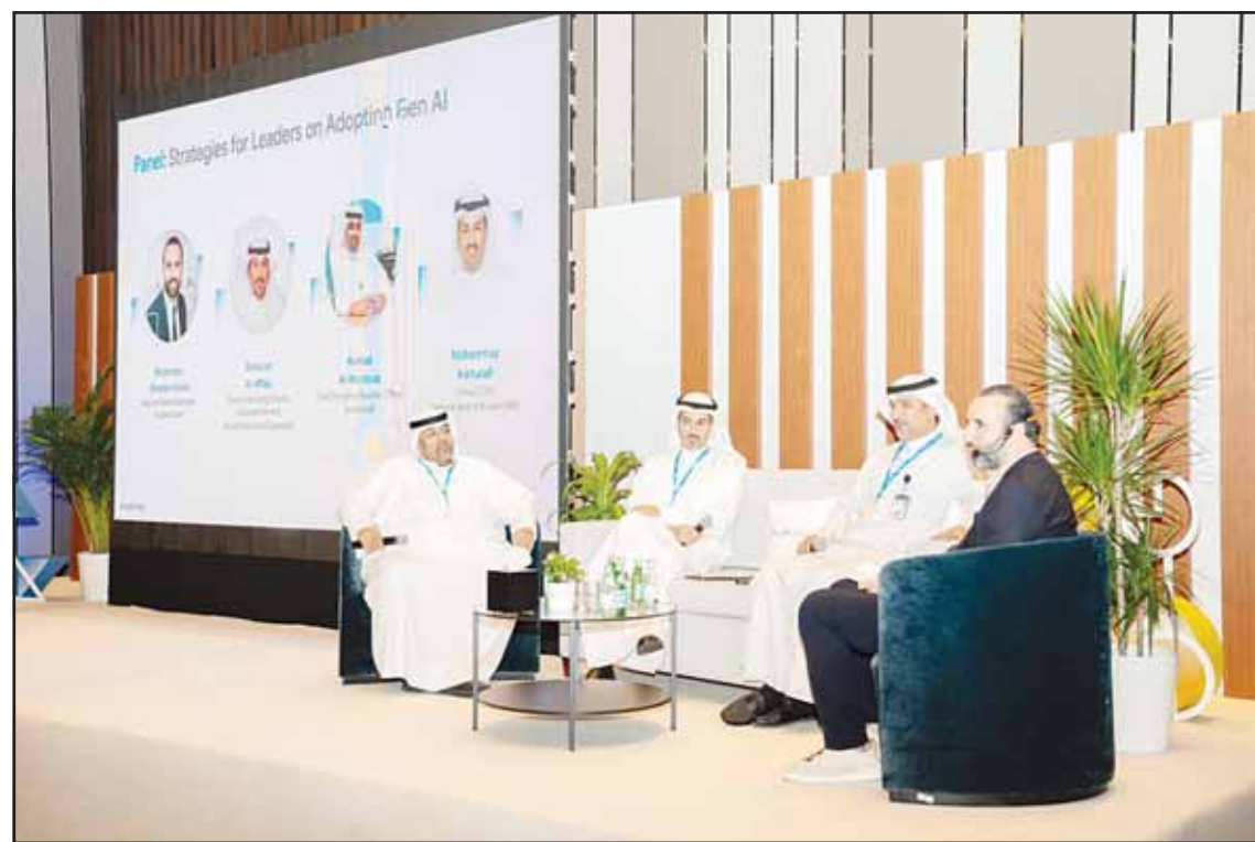
Al Marzouq highlighted Zain's efforts to adopting GenAI.

The funds will be used to reduce debt, pay interest, and bolster cash reserves, giving the airport flexibility as it prepares for upcoming talks to refinance over £700 million in loans, which are due in March 2026.