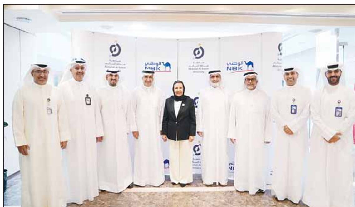
Officials of NBK and AASU pose for a group photo.