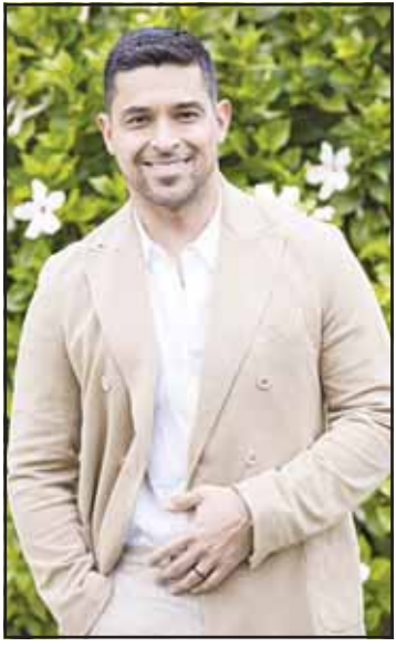
Actor Wilmer Valderrama poses for a portrait on Saturday, Sept. 21, 2024, in Los Angeles.

LOS ANGELES, Oct 14, Wilmer Valderrama vowed to “never let his family down” the night that he landed his breakthrough role as foreign exchange student Fez on “That ‘70s Show.” “I have been given the chance to lift us all, and I won’t blow this incredible opportunity. Every performance I give will be the absolute best anyone has ever seen,” he writes in his memoir “An American Story: Everyone’s Invited.” “Everyone’s Invited,” released last month, chronicles his family’s journey as Venezuelan immigrants in the United States and a young boy’s dream to help his family while making his acting dreams a reality. At 44, Valderrama says he’s stayed true to his teenage vow and has always felt a sense of urgency to provide his family with a “happier life.” “I grew up in Venezuela, so, I was front row to understand how it all could have been. So, I’m just incredibly grateful. I don’t know if I can ever