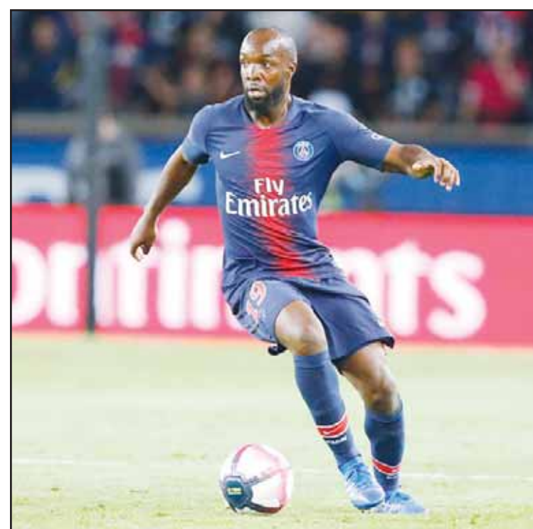
In this file photo, Paris-Saint-Germain player Lassana Diarra dribbles the ball during a French League One soccer match against Saint-Etienne at the Parc des Princes stadium in Paris.