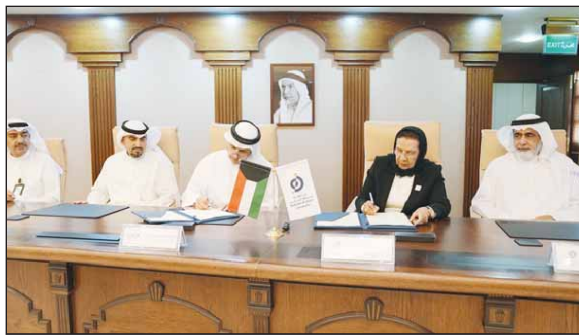
The cooperation agreement being signed by the two parties.

5-year deal aims to exchange expertise and sponsor students' activities