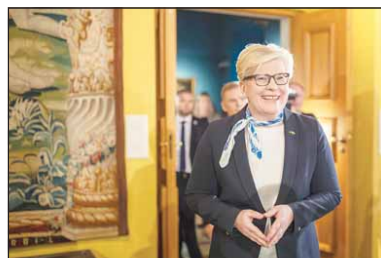
Prime Minister Ingrida Šimonytė arrives to speak at a press conference after a first round of Lithuania's parliamentary election, in Vilnius, Lithuania on Oct 14.

The first round of Lithuania's parliamentary elections began on Sunday, with voters set to elect 141 members to the Seimas, the country's unicameral