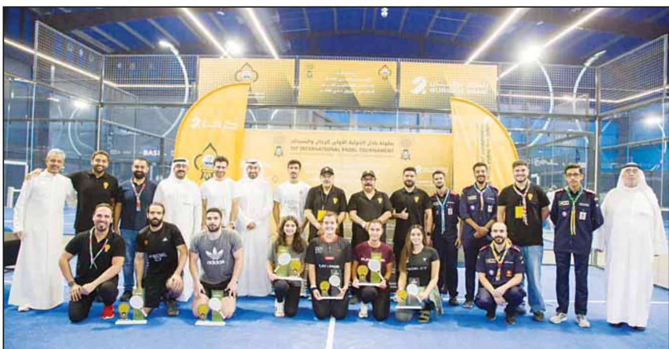
Winners of the First International Padel Tournament in a group photo with the representatives of the Bank and organizing committee.