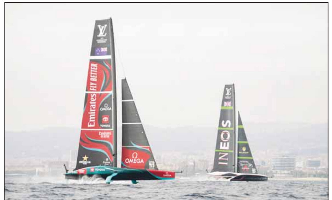
Ineos Britannia and Emirates Team New Zealand race during the Louis Vuitton 37th America's Cup Day 3 race 4 in Barcelona, Spain.

FIFA's role, the complaint states, as governing body and regulator conflicts with its commercial objectives as a competition organizer.