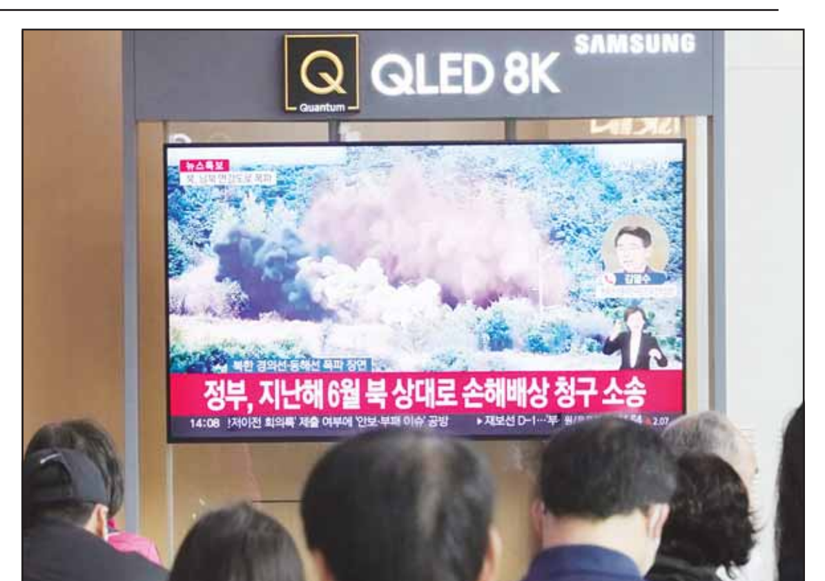
A TV screen reports North Korea has blown up parts of northern side of inter-Korean roads during a news program at Seoul Railway Station in Seoul, South Korea, on Oct 15.

Experts say Kim likely aims to diminish South Korea's voice in the regional nuclear standoff and seek direct dealings with the United States. Kim may also hope to diminish South Korean cultural influence and bolster his family's dynastic rule at home.