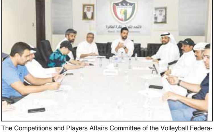
tion meeting in progress.

In other matches, Al-Salmiya continued its positive streak, defeating Al-Sahel in the second round at Sheikh Saad Al-Abdullah Complex Hall. The "Sky Blues" secured their second consecutive victory, raising their points tally to four, sharing the top spot with Al-Arabi, who also achieved back-to-back wins, including a 30-26 victory over Khaitan. Meanwhile, Burgan claimed its first win of the season with a 28-25 victory over Al-Fahaheel after losing its opening match to Al-Arabi.