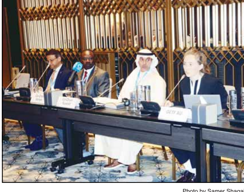
Assistant Minister of Foreign Affairs Ambassador Hamad Al-Mishaan during the

He highlighted the importance of the international community's continuous support for Somalia and partners in East Africa in their efforts to disrupt the Shabaab movements, as it remains one of the most dangerous organizations affiliated with Al-Qaeda, which has caused the deaths of thousands in Somalia and various parts of East Africa. "All countries must be urged to track the causes of its continuation. The region has become a fertile soil for recruiting fighters and a source for future generations who adopt radical extremist beliefs, given that a child born in such environments is a time bomb," he added.