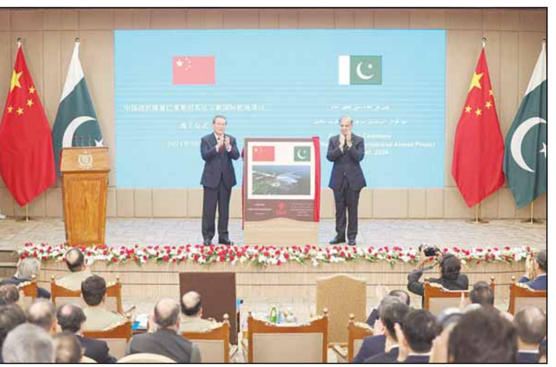
Chinese Premier Li Qiang attends a ceremony with Pakistani Prime Minister Shehbaz Sharif to mark the completion of the New Gwadar International Airport project at the Prime Minister's Office in Islamabad, Pakistan, on Oct