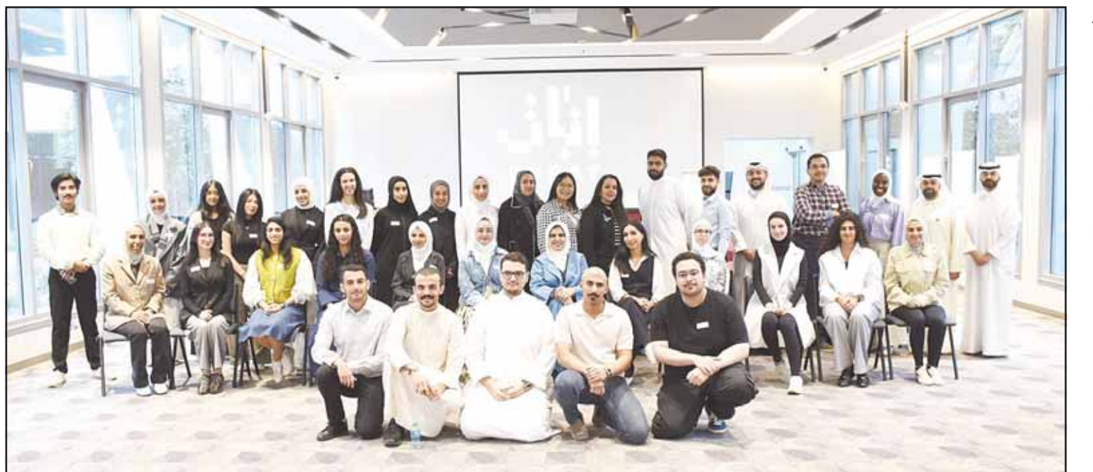
Participants pose for a group photo

workplace, whether in the public or private sector.' ENBAT is being facilitated by eight trainers, all of whom have private sector experience and have been trained by en.v to help the participants build the core skills needed to become effective leaders and collaborators. The program includes four modules: Self, Systems, and Critical Thinking; Cross Cultural Communication; Design Thinking; and Work Culture & Applying Skills.