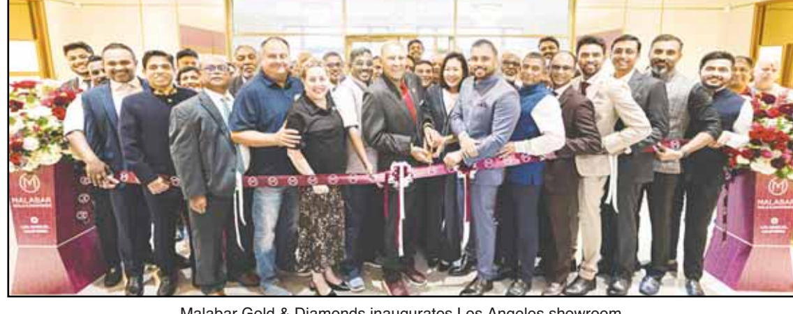
Malabar Gold & Diamonds inaugurates Los Angeles showroom.

Located in the city of Artesia, and boasting over 6,500 sq.ft of jewellery shopping area, the showroom houses over 30,000 jewellery designs from 20 countries across 25 exclusive brands and collection in gold, diamond & precious gem jewellery. An extensive collection of bridal jewellery, alongside a wide range of