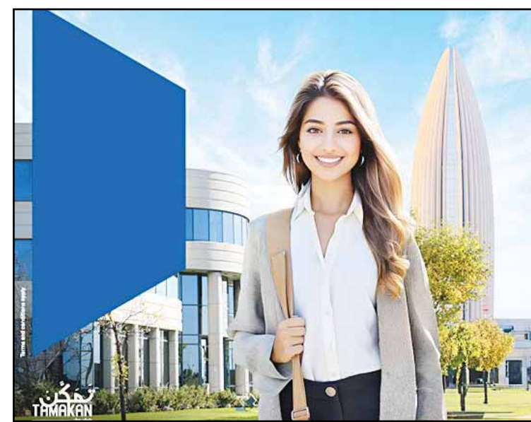
NBK sponsors 'TAMAKAN' training program.

dates for employment NBK will be hosting the program and providing a real business challenge that participants will work on into the final stages of the training