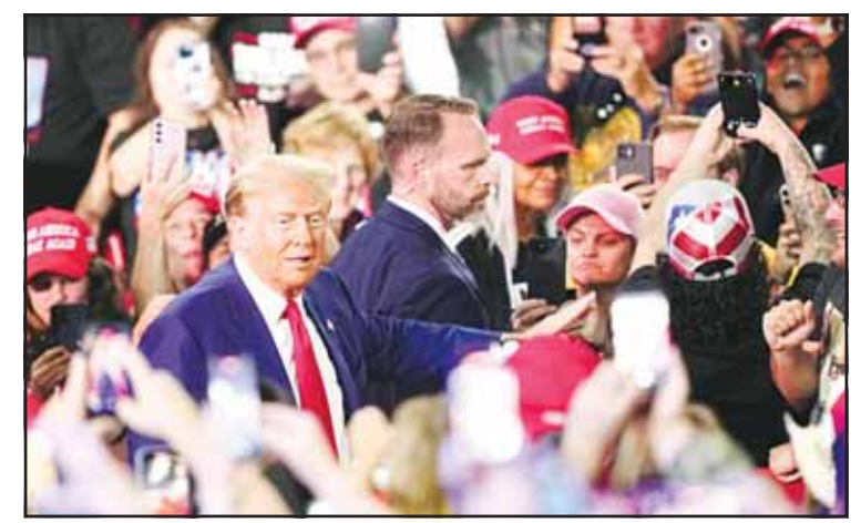
Republican presidential nominee former US president Donald Trump arrives at a campaign town hall at the Greater Philadelphia Expo Center & Fairgrounds, Monday, Oct. 14, in Oaks, Pa.

Trump's running mate, Sen. JD Vance, defended Trump's comments