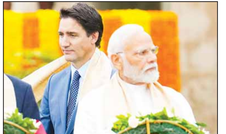
Canada's Prime Minister Justin Trudeau, left, walks past India's Prime Minister Narendra Modi as they take part in a wreath-laying ceremony at Raj Ghat, Mahatma Gandhi's cremation site, during the G20 Summit in New Delhi on Sept 10, 2023.

Canadian police arrested four Indian nationals related to last year's murder