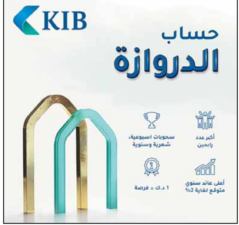
KIB's Al Dirwaza account.

Today, KIB has taken concrete steps in implementing its new strategic objectives. The Bank has cemented its role as a key player in the local banking industry and has continued to maintain its strong financial performance; enabling it to be globally recognized for its strong credit rating and financial