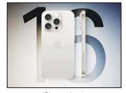
iPhone 16 unit

The ministry has issued a statement to inform residents of the affected areas about the situation and ensure that steps are taken to mitigate the inconvenience caused by the maintenance.