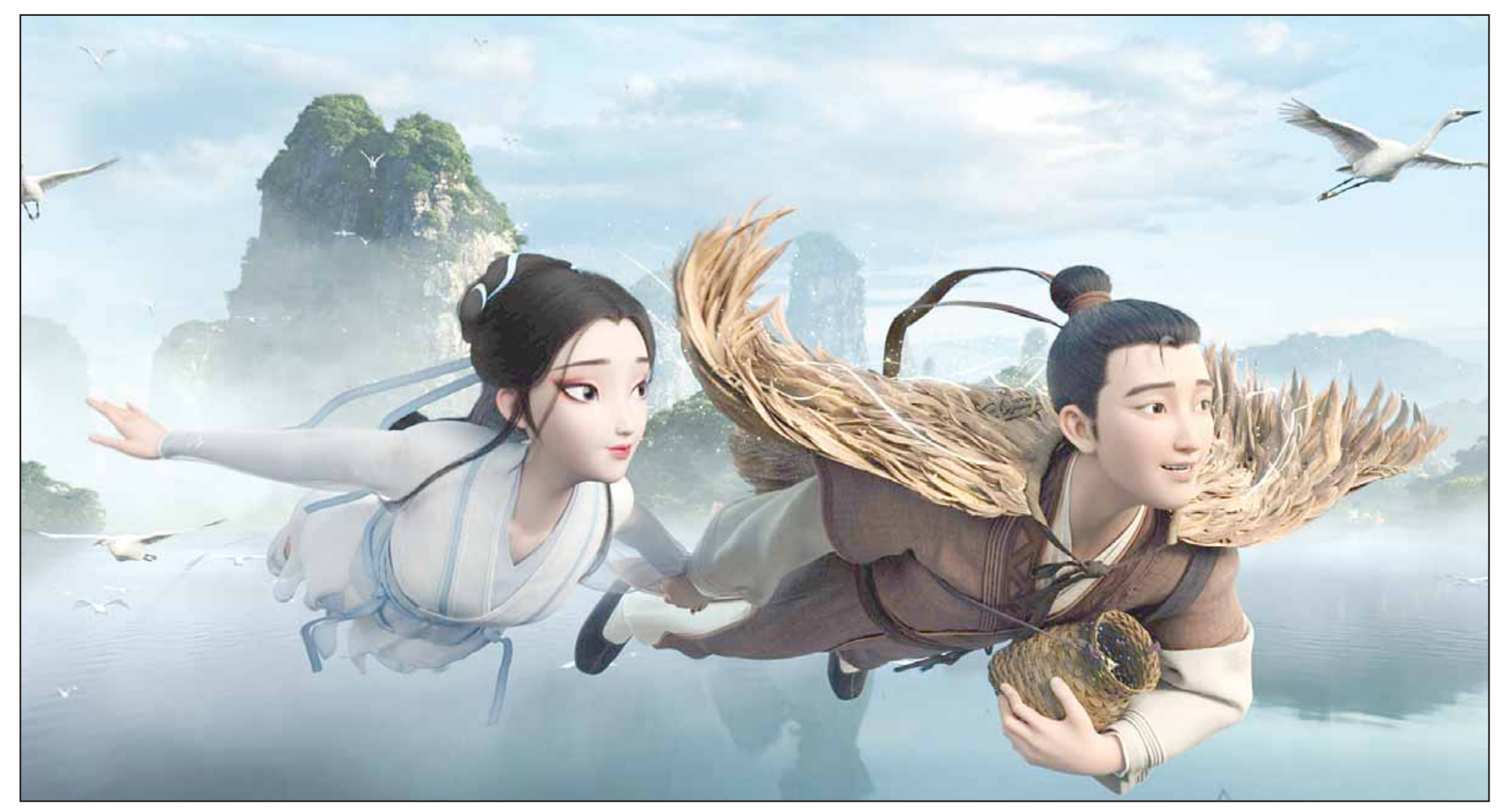
This undated image provided by Light Chaser Animation, a leading Chinese animation production team, shows a poster of the animated film 'White Snake: Afloat'. (Xinhua)