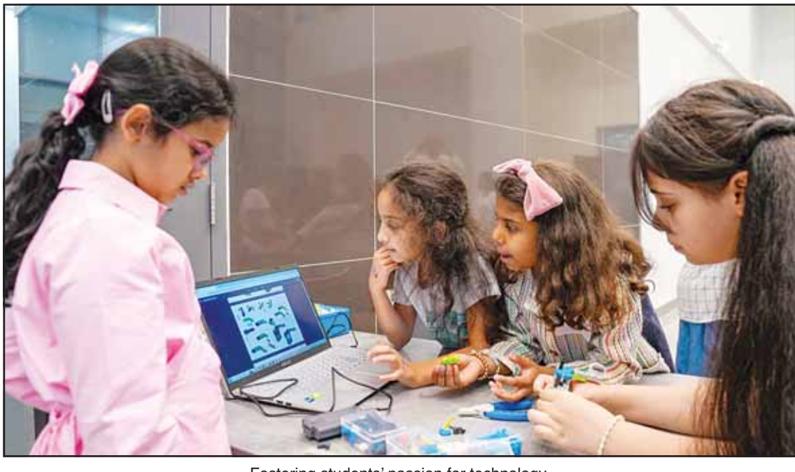
Fostering students' passion for technology.