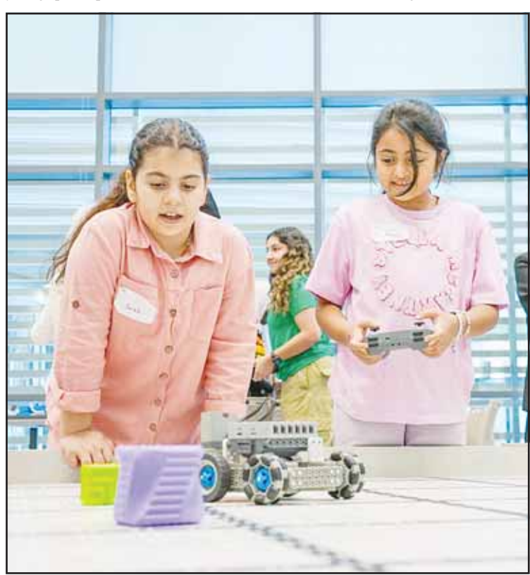
Promoting a spirit of collaboration and teamwork.

to boosting the girls' self-confidence and enhancing their problem-solving and creative thinking skills. The work-