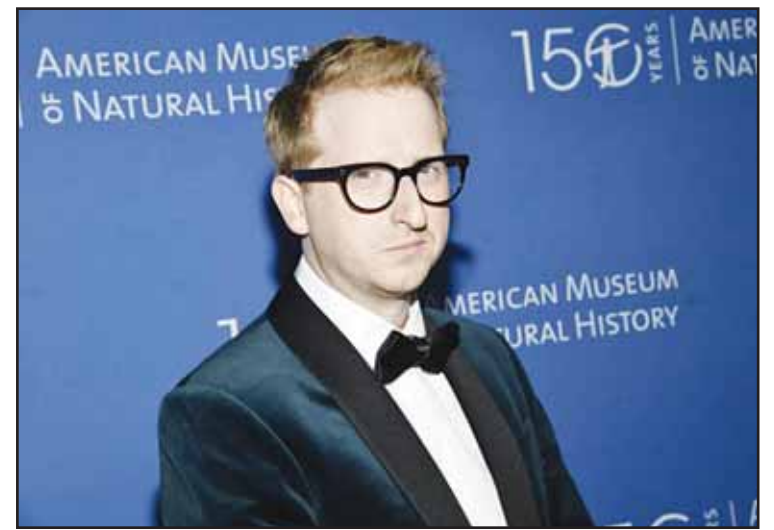
James Austin Johnson attends The Museum Gala at the American Museum of Natural History on Thursday, Dec. 1, 2022, in New York.

After Trump's first election victory in 2016, the show opening was serious and stayed that way with Kate McKinnon, who played Hillary Clinton on the show, appearing as the losing candidate sitting at the piano and singing a somber version Leonard Cohen's "Hallelujah," changing only one verse from the best-known versions of the song.