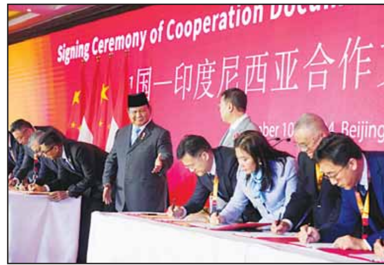
Indonesian President Prabowo Subianto, (center left), gestures as he witnesses a signing ceremony of cooperation documents between Indonesia and China during the Indonesia-China Business Forum in Beijing on Nov 10.

Xi noted that Prabowo visited China in his first overseas trip right after he was elected in March and chose China as the first country to visit after taking office, which speaks volumes about the great importance he attaches to developing relations with China and dem-