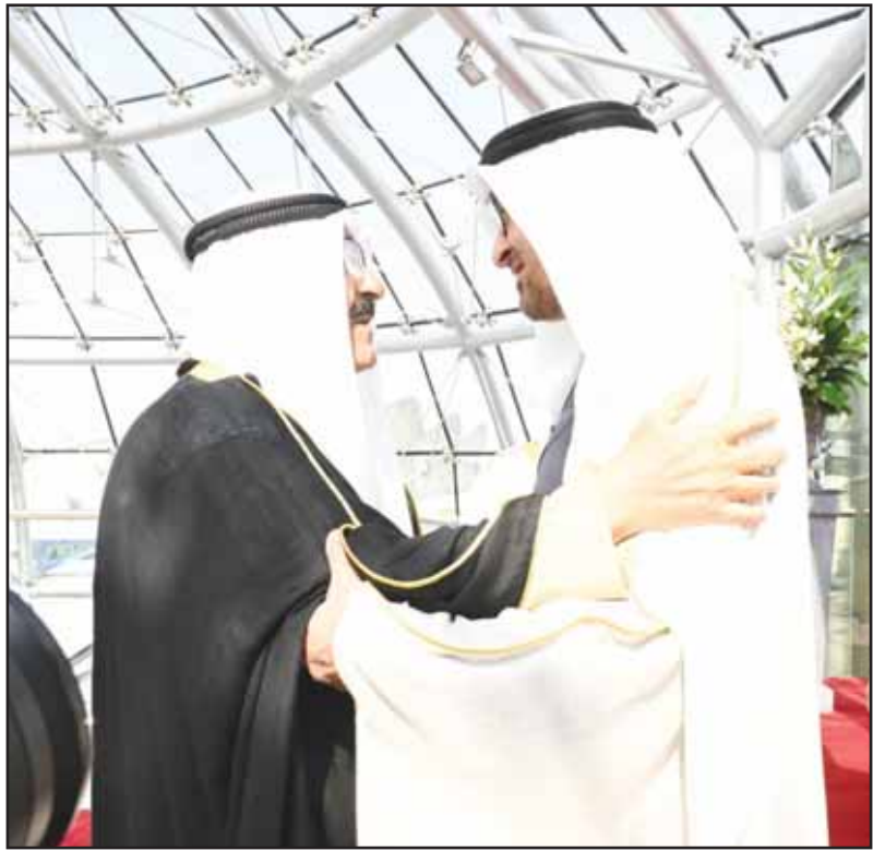
His Highness the Amir Sheikh Meshal Al-Ahmad Al-Jaber Al-Sabah welcomes President of the UAE Sheikh Mohamed bin Zayed Al-Nahyan.