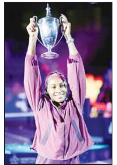
Coco Gauff of the U.S. holds her trophy after winning against China's Qinwen Zheng in their women's singles final match of the WTA finals at the King Saud University Indoor Arena, in Riyadh, Saudi Arabia.

nal which included 26 break points. Gauff also won their only previous meeting, in the Rome quarterfinals on clay in May.