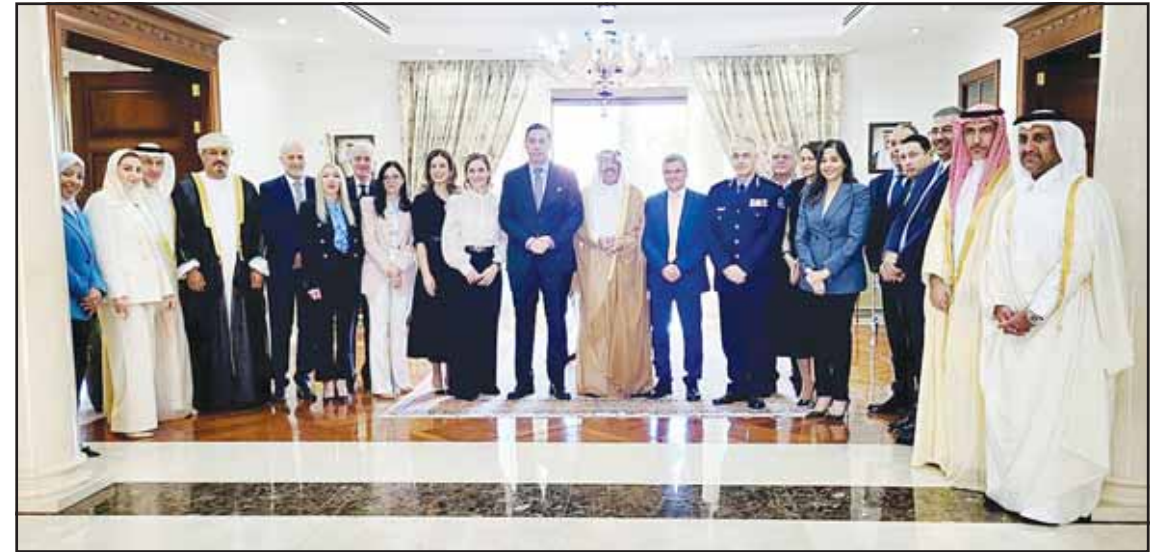
Kuwaiti Ambassador Al-Kharafi in a group photo on the sidelines of the banquet.

He emphasized the ongoing efforts to expand bilateral economic and investment cooperation and mentioned an upcoming evaluation of past initiatives aimed at further elevating these partnerships.