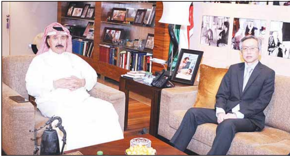
The Editor-in-Chief of Arab Times and Al-Seyassah newspapers Ahmed Al-Jarallah and the outgoing Japanese ambassador to Kuwait.

Abdaly 31 18 Bubyan 33 19 Jahra 29 20 Failaka Island 31 21 Salmiyah 28 23 Ahmadi 29 20 Jal Aliyah 29 18 Nuwaisib 29 20