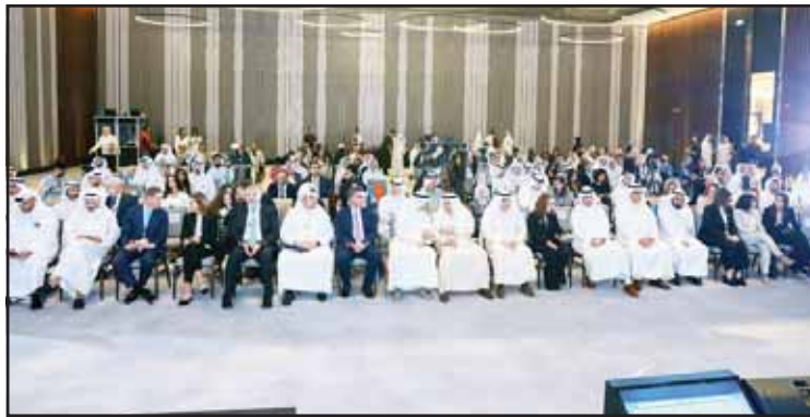
Shaikha Al-Bahar highlights urgent need for educational reform in Kuwait at the 'MoneyTech' summit

force, equipping it with the skills and knowledge necessary to foster a diversified, knowledge-based economy.