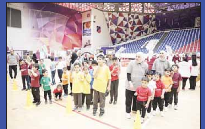
Great participation of children in the Special Olympics.

She also expressed gratitude to the Public Authority for Sports, the Ambition Club, the Marine Club, and the Kuwait Club for their support, which contributed to the success of the program and the wider Olympic activities.