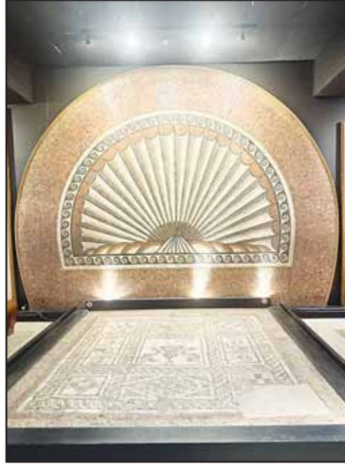
Other mosaics in good condition.