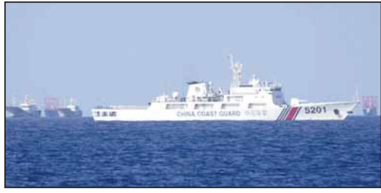
A Chinese coast guard vessel stays beside suspected Chinese militia ships near Thitu island, locally called Pag-asa island on Nov 6 ahead of a Philippine military multi-service joint exercise at the disputed South China Sea, Philippines. (AP)