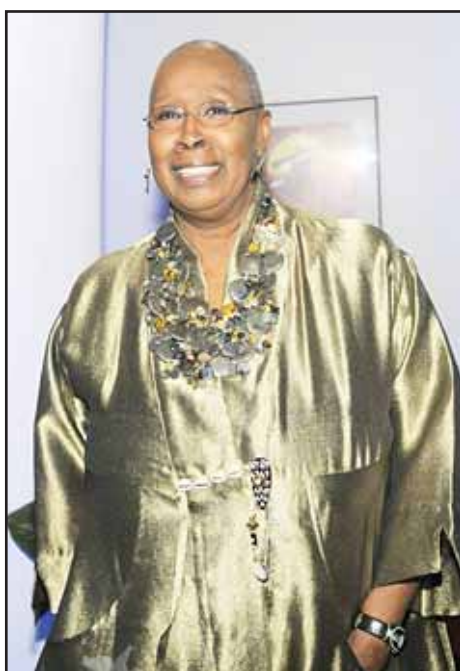
Choreographer Judith Jamison attends the BET Honors at the Warner Theatre on Jan. 17, 2009, in Washington.

Jamison died Saturday after a brief illness in New York, surrounded by close friends,