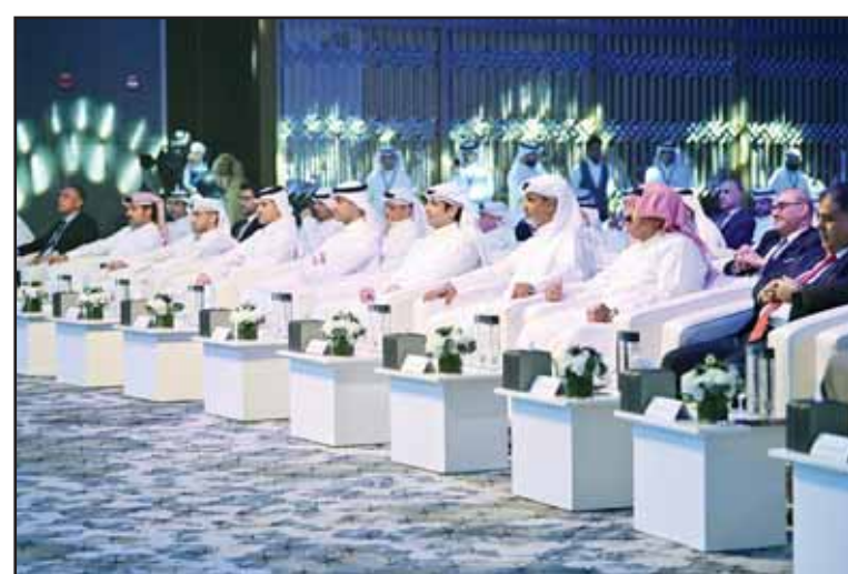
VIP attendees during the draw for the 'Gulf 26'.

the past seven years, and everyone is working toward its success." He concluded, "Kuwait is well-prepared to host, with all teams set to bring their main squads as per tournament rules."