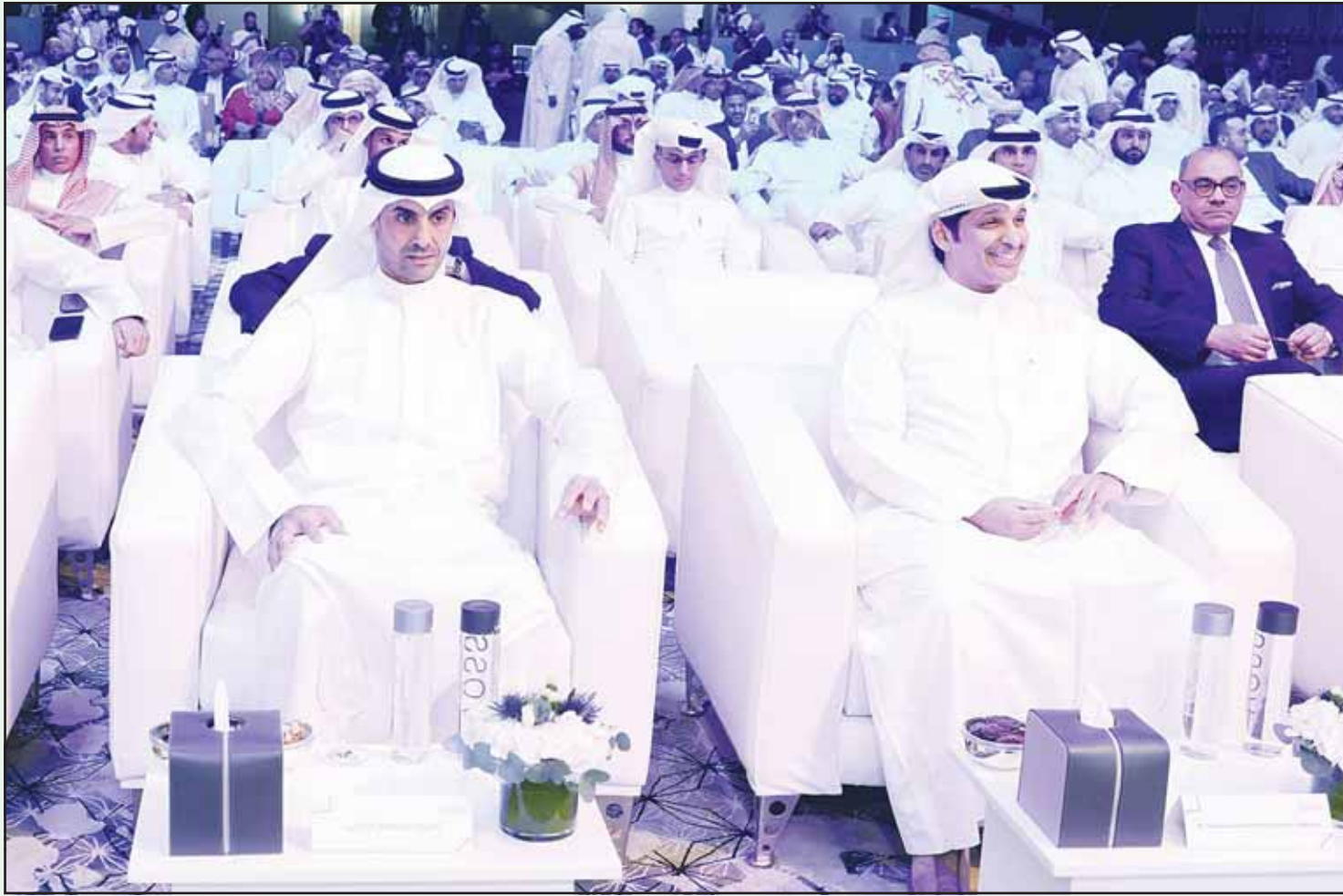
Minister Abdulrahman Al-Mutairi and Bader Al-Kharafi at the ceremony.

Kuwait to face Oman in opening match at Jaber Al-Ahmad International Stadium; official mascot 'Haydo' unveiled