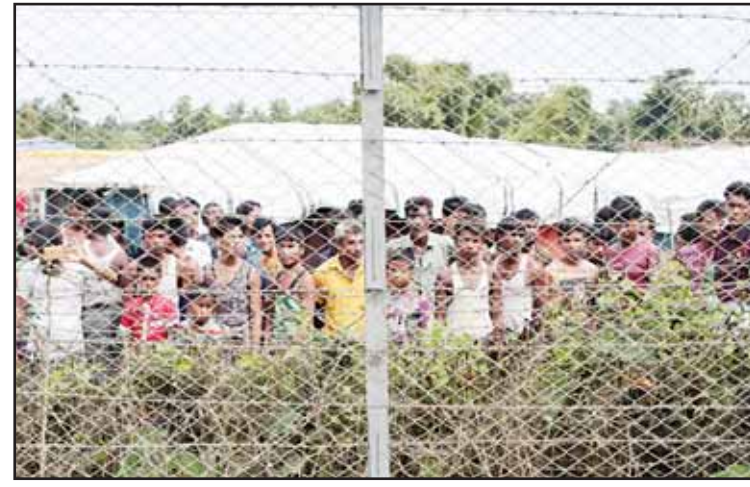
Rohingya refugees gather near a fence during a government organized media tour, to a no-man's land between Myanmar and Bangladesh, near Taungpyolay village, Maung Daw, northern Rakhine State, Myanmar on June 29, 2018.

In August 2017, attacks by a Rohingya insurgent group on Myanmar security personnel triggered a brutal campaign by