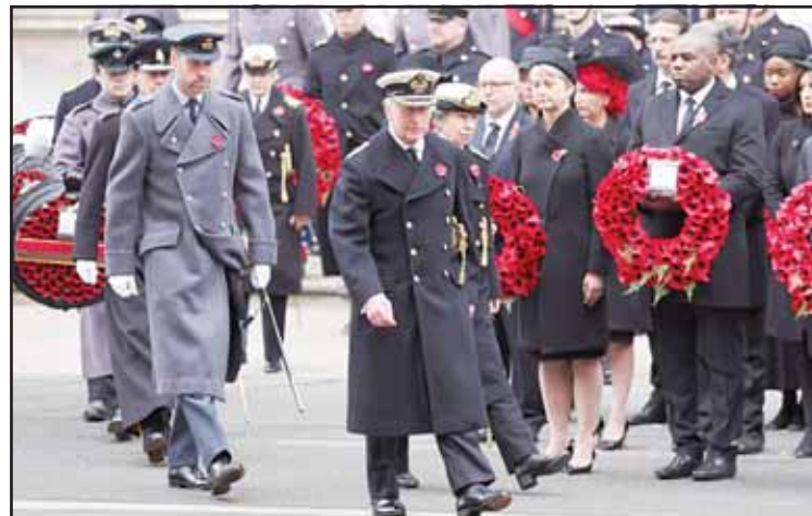
Front from left: Prince William, Prince of Wales, King Charles III and Anne, Princess Royal walk during the National Service of Remembrance at The Cenotaph in London, England on Nov 10.

Charles' ceremonial role as commander in chief of the armed forces is a holdover from the days when the monarch led his troops into battle. But the link between the monarchy and the military is still very strong, with service members taking an oath of allegiance to the king and members of the royal family supporting service personnel through a variety of charities. Charles and William both served on active duty in the military before taking up full-time royal duties.