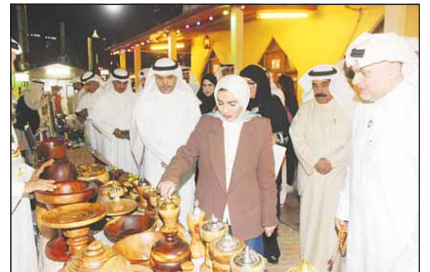
Minister of Social, Family and Childhood Affairs Dr. Amthal Al-Huwaila during the opening of Salmiyah popular cafe.