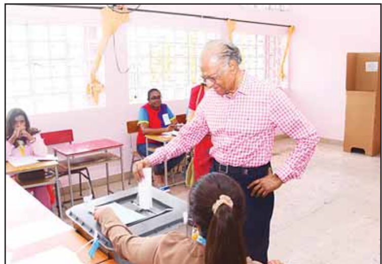
Leader of the Labour Party, Navin Ramgoolan, casts his vote in Mauritius elections in Port Louis on Nov 10.

The region, divided between India and Pakistan but claimed by both in its entirety, has experienced an increase in violence. The Indian military said a joint team of soldiers and police raided a village near northwestern Sorepore town late Thursday following a tip about the presence of a group of militants.