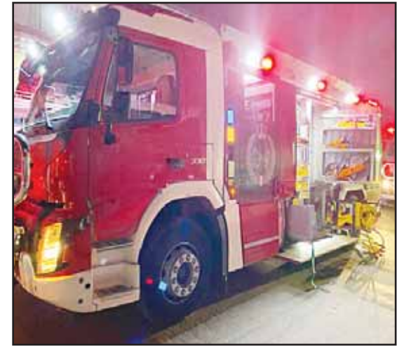
Rescue vehicle at the site.

This conference also builds on the achievements of the association's first conference in May 2023, which saw notable accomplishments. These included performing delicate and complex surgeries in collaboration with international experts, as well as developing a unified protocol for the treatment of rectal cancer in partnership with the Kuwait Cancer Control Center.