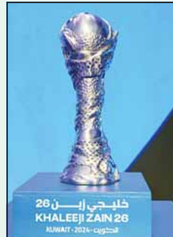
The Khaleeji Zain 26 Cup.

Zain Group recently announced its role as the Title Partner of the tournament, now branded as Khaleeji Zain 26 for the second consecutive time. Kuwait will host this historic sporting event for the