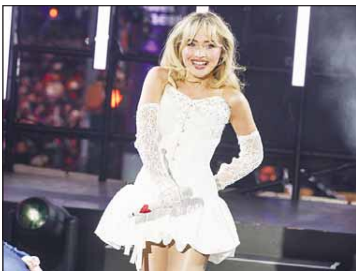
Sabrina Carpenter performs during the Times Square New Year's Eve celebration, Sunday, Dec. 31, 2023, in New York.

Last year, Jack Antonoff took home producer of the year, non-classical for a third year in a row, tying Babyface as the only other producer to do so consecutively. This year, he didn't receive a nod in that category - one he has held a place in since 2019. Who will take the mantle?