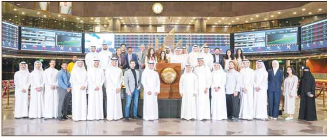
Boursa Kuwait hosts CFA Research Challenge for financial students.

Kuwait and is proud to have the exchange as the first strategic partner of the Research Challenge in Kuwait. Since its establishment, the Society has sought to raise the standards of professionalism in Kuwait's investment sector, supporting the ongoing education and professional development of industry practitioners through specialized educational programs, organizing conferences, supporting CFA charterholders, and fostering collaboration among members. It is also committed to the promotion of ethical practices that contribute to the development of Kuwait's capital market and all its stakeholders." In October 2018, Boursa Kuwait signed a Memorandum of Understanding (MoU) with the CFA Society Kuwait, aiming to provide educational content on the fundamentals of investing through Boursa Academy Online, the digital educational portal developed by Boursa Kuwait which seeks to enhance financial literacy among novice and professional investors in Kuwait. The MoU enables both organizations to combine their expertise in