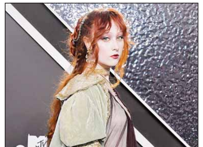
Chappell Roan arrives at the MTV Video Music Awards on Wednesday, Sept. 11, 2024, at UBS Arena in Elmont, N.Y.