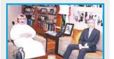
2 Editor-in-Chief of Arab Times Al-Jarallah receives outgoing Japanese ambassador