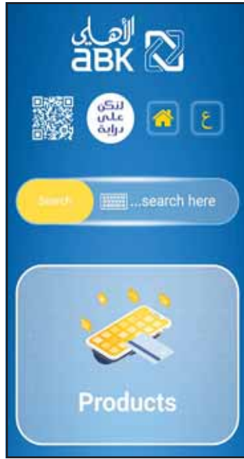
The launch of innovative interactive features.