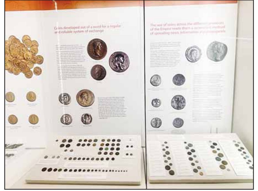
Coins used in the city of Verulamium.