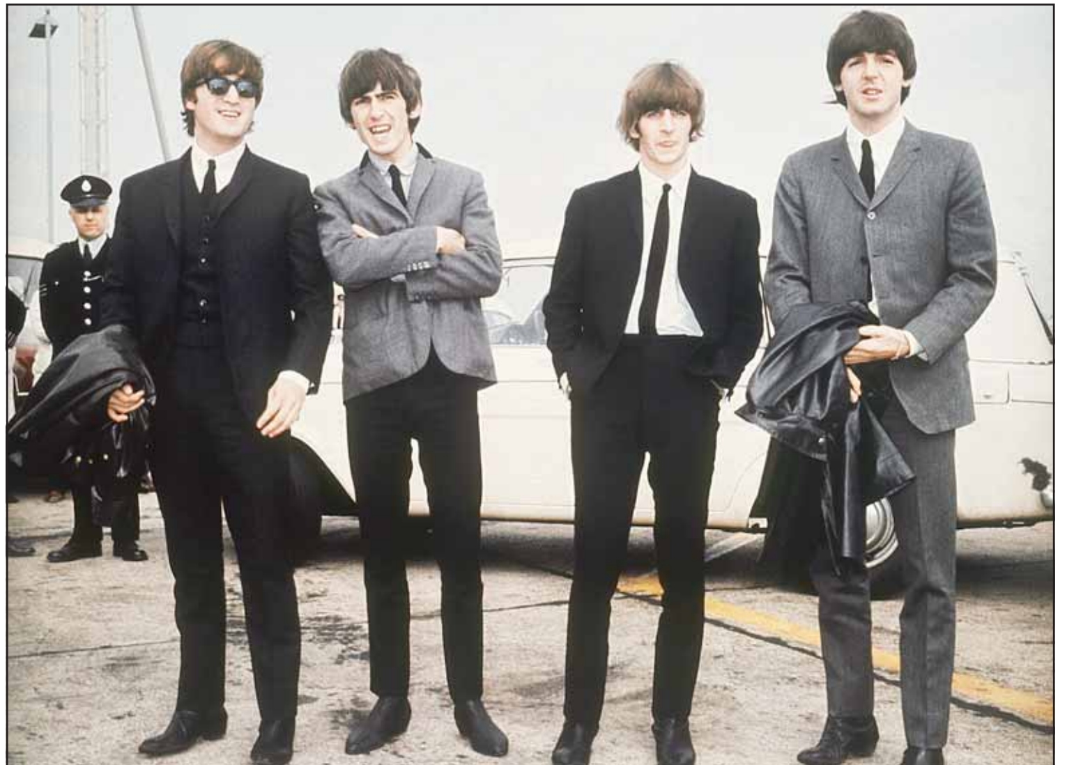
The Beatles, from left, John Lennon, George Harrison, Ringo Starr and Paul McCartney appear in Liverpool, England on July 10, 1964, for the premiere of their movie "A Hard Day's Night."

Last year's album of the year category was dominated by pop women - and that continues, with Taylor Swift, Chappell Roan, Sabrina Carpenter and Charli XCX's rave-ready approach to the genre receiving nods. The latter is a nice surprise (more on that below), but the two