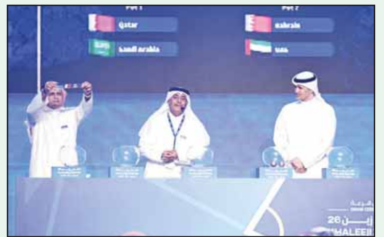
From the draw ceremony.

Zain is reaffirming its commitment to supporting major sporting events, enhancing Kuwait's position as a key player in regional sports, boosting the development of football among the youth.