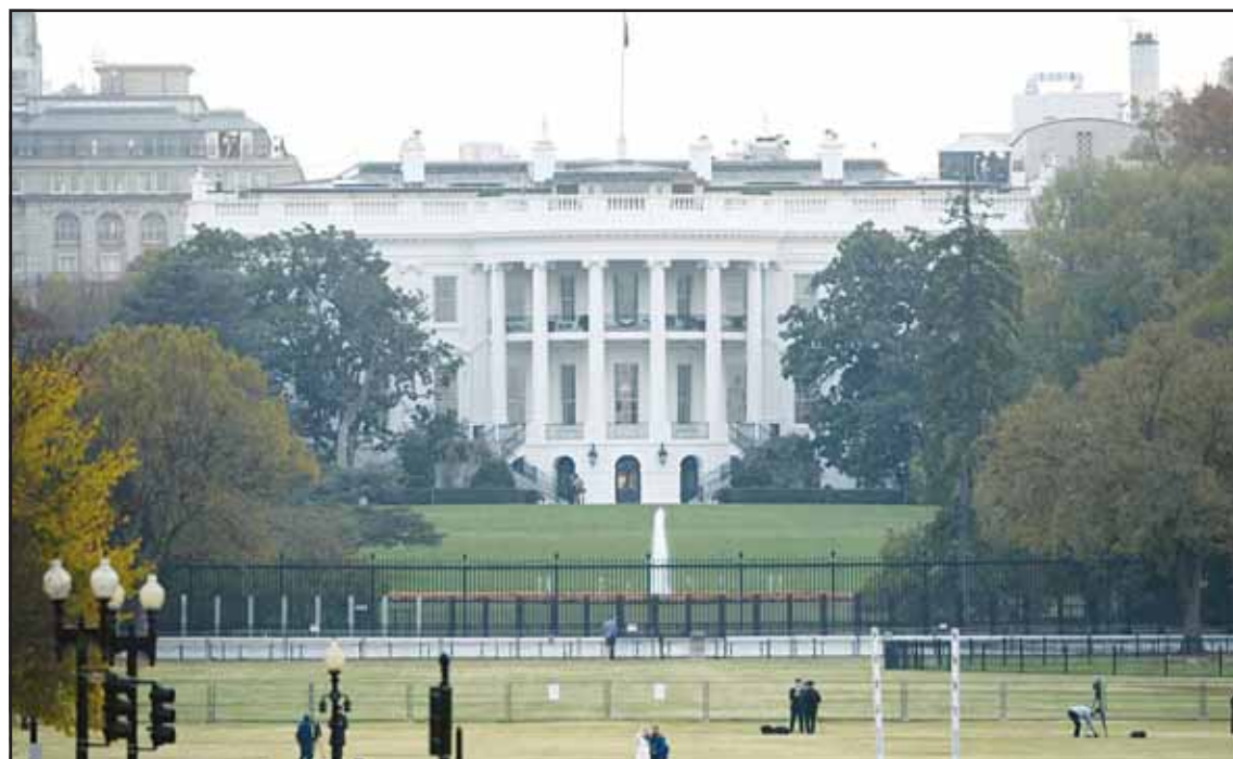
The White House is seen in Washington on Nov 5.

"That's something they do in Russia. That's something they would do in China, not the United States, not here in the beacon of freedom for the world," Dooley said. Republicans have held congressional hearings for nearly two years but have provided little substance to the claim that Biden has "weaponized" the department.