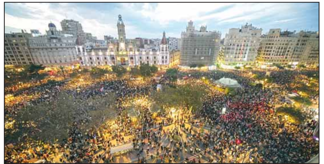
Thousands of demonstrators gather in front of the city council for a protest organized by social and civic groups, denouncing the handling of recent flooding under the slogan "MazÚn, Resign", aimed at the president of the regional government Carlos Mazon, in Valencia, Spain on Nov 9.