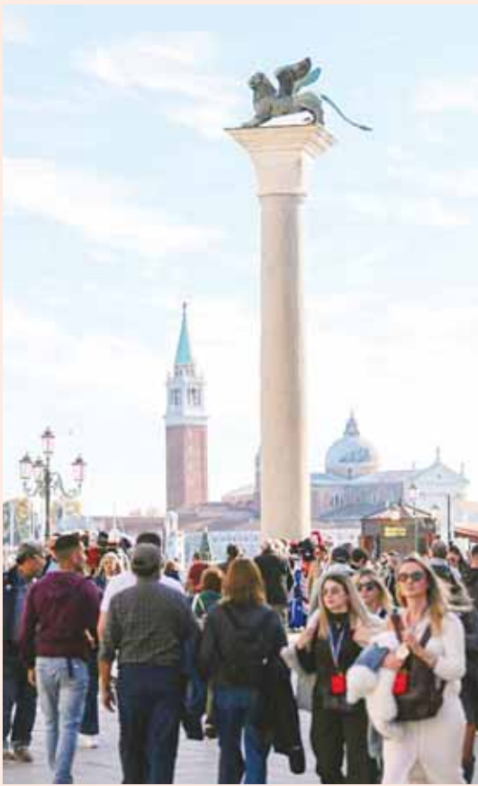
This photo taken on Nov. 6, 2024 shows the Lion of Venice on St. Mark Square, Venice, Italy. (Xinhua)

ROME, Nov 10, (Xinhua): Towering atop a column in St. Mark Square, Venice, Italy, the massive bronze lion has long symbolized the city's power and heritage for centuries. Yet its actual origin has remained a mystery.