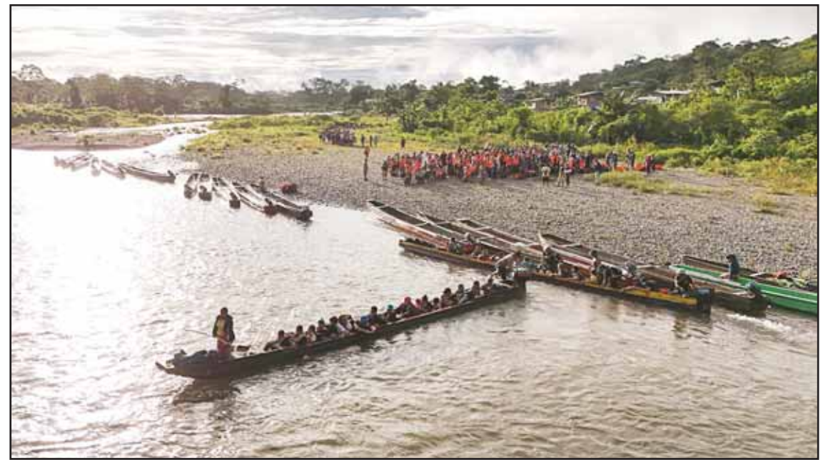
Migrants board boats to continue their journey north hoping to reach the United States after walking across the Darien Gap from Colombia in Bajo Chiquito, Panama on Nov 9.