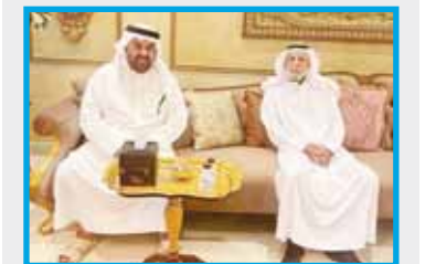
5 Sheikh Khalid Al-Bader Al-Sabah visits renowned artist Ibrahim Al-Sallal