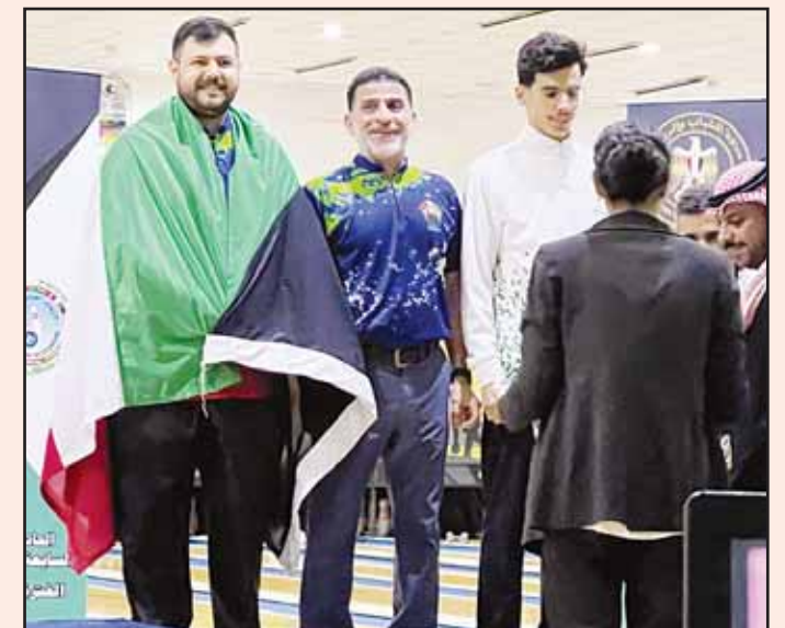
Crowning of the winners on the podium.

Al-Amiri highlighted the federation's strategic plan and technical staff's efforts to train future generations capable of representing Kuwait in Arab, Asian, and international competitions, emphasizing the country's commitment to nurturing youth in all fields.