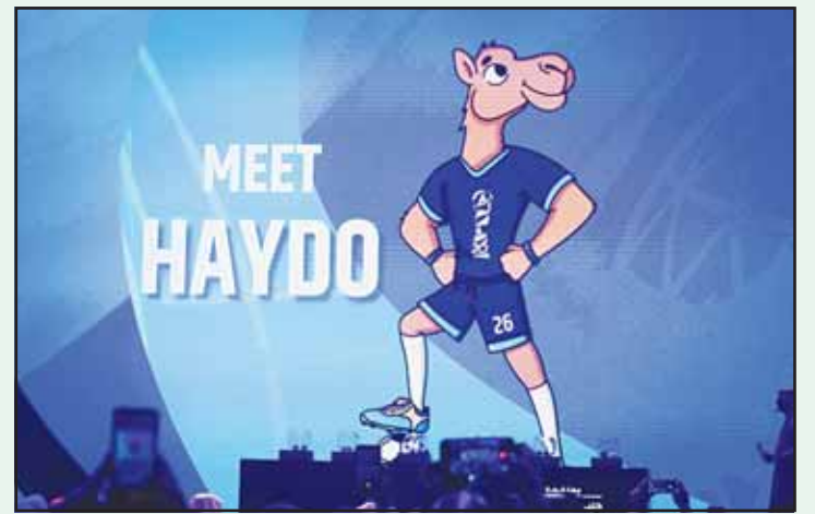
Unveiling Haydo, the tournament's official mascot.

KUWAIT CITY, Nov 10: The organizing committee for Khaleeji Zain 26 (the Arabian Gulf Cup) held a ceremony at the Waldorf Astoria Kuwait to conduct the tournament draw, that unveiled the eagerly awaited matchups among the eight teams competing in the region's premier sporting event, hosted in Kuwait from December 21, 2024, to January 3, 2025.