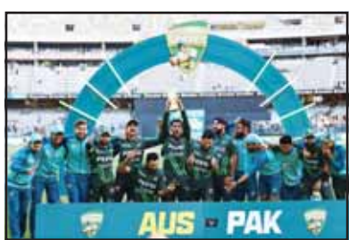
The Pakistan team pose with their trophy after winning their one day international cricket match and series over Australia in Perth, Australia.