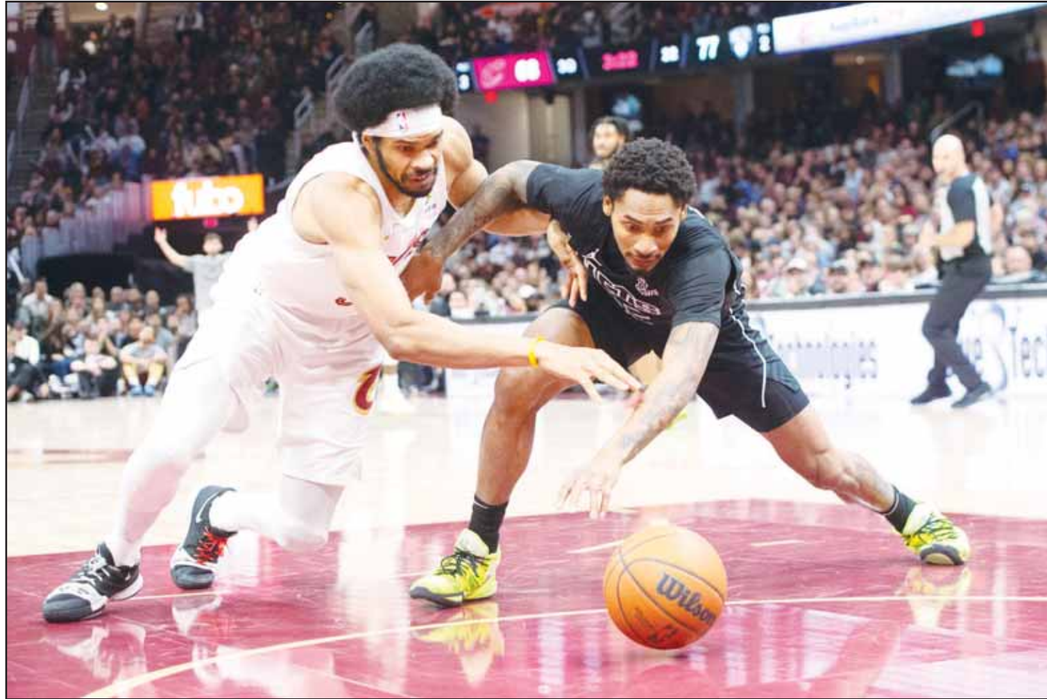
Cleveland Cavaliers' Jarrett Allen, left and Brooklyn Nets' Keon Johnson (45) dive for a loose ball during the second half of an NBA basketball game in Cleveland.

CLEVELAND, Nov 10, Evan Mobley had 23 points and 16 rebounds, and Donovan Mitchell scored 22 as the Cleveland Cavaliers rallied for a 105-100 win over the Brooklyn Nets, becoming the 12th team in NBA history to start a season 11-0.