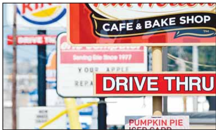
Fast food restaurant signs line Peach Street in Erie, Pa., Aug. 26, 2014.

"It's not going to happen," Holtz-Eakin said.