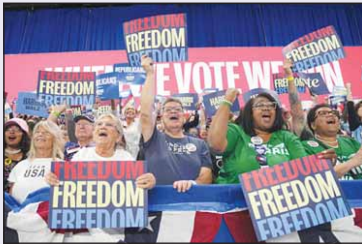
Supporters cheer as Democratic presidential nominee US Vice President Kamala Harris speaks during a campaign event, Oct 30, in Harrisburg, Pa.