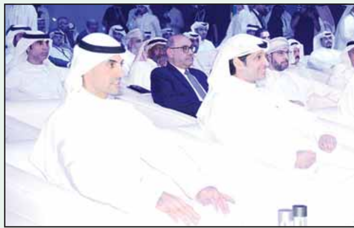
Al-Mutairi and Al-Kharafi observe the draw.

Khaleeji Zain 26 will feature two stages: the group stage and the knockout stage, culminating in the final match. The draw divides the eight teams into two groups, with