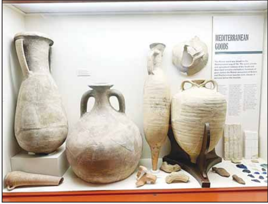
Pottery vessels found in excavations in the city at the beginning of the last century.