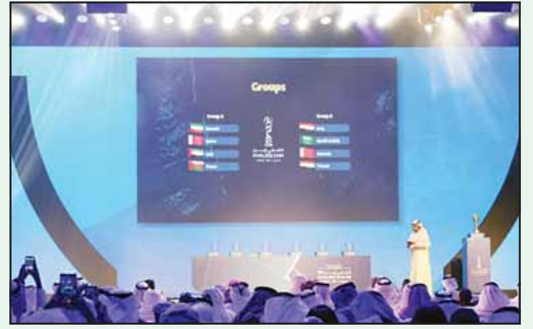
The draw results.