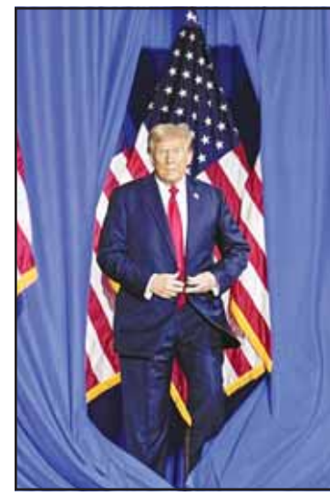
Republican presidential nominee former US president Donald Trump arrives for a campaign event on Sept 29 in Erie, Pa.

Texas and Florida are already reliably Republican, but more Hispanics turning away from Democrats in future presidential races could further dent the party's "blue wall" of Pennsylvania, Michigan and Wisconsin, that had helped catapult it to the White House before Trump romped through