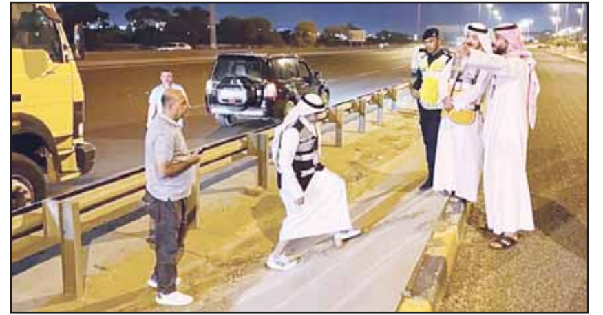
Senior Municipality officials giving instructions on the site.