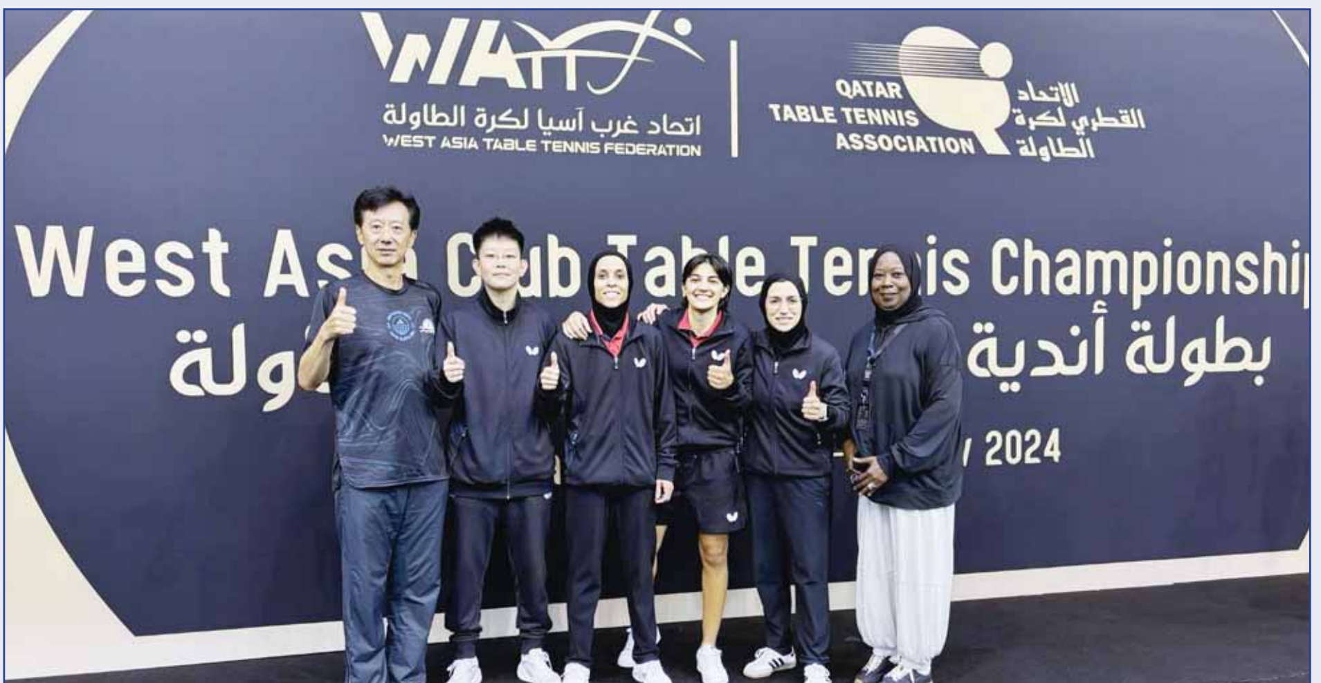
The girl's club participating in the tournament.

The championship, which began last Wednesday, is being held on six tables during both morning and evening sessions and is officiated by 14 referees from the Qatari Table Tennis Federation.