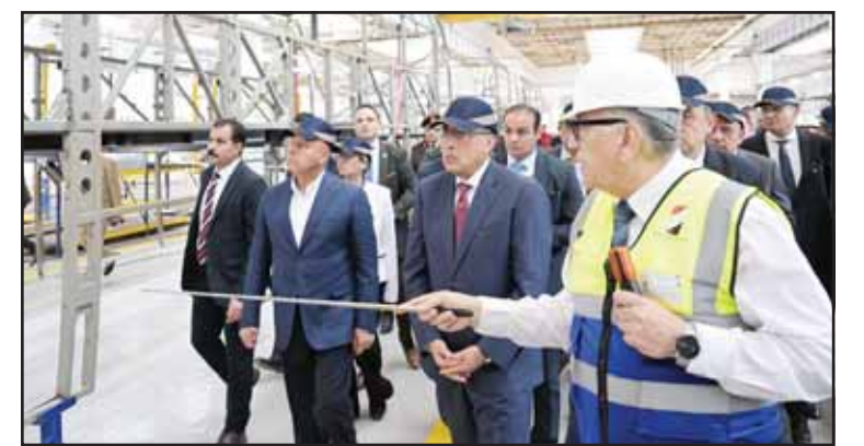
Egypt restarts Al-Nasr Automotive Company as part of plans to localize industry in the country.

During the ceremony, Madbouli witnessed signing a contract between the company on one hand and Singapore-Taiwan and UAE companies on the other to manufacture the first 24-passenger minibus, with a production capacity of 300 buses in 2060.