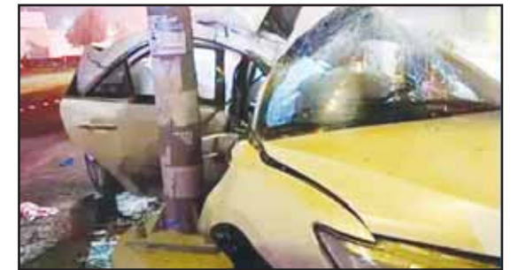
Three hurt as car rams into light pole.

Sources also confirmed that the ministry started the repair works on Salmi Road through a Turkish company. Sources said this is one of 18 contracts signed by Ministry of Public Works Dr. Noura Al-Mashaan at a cost of KD400 million -- 12 contracts for roads in governorates and six for expressways.