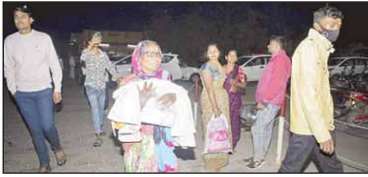
A woman rushes a child to the emergency ward after a fire broke out in a neonatal intensive care unit at Jhansi Medical College hospital in Jhansi, India on Nov 15. (AP)

Dissanayake's National People's Power Party (NPP) won 159 of the 225 seats, according to the Elections Commission. (AP)