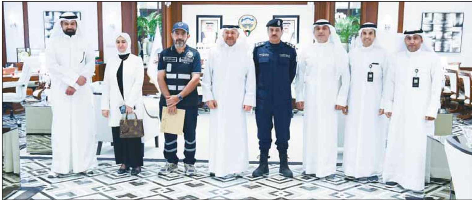
Farwaniya Governorate pics

The survey shall contribute to the provision of information that helps the ministry and other national authorities lay down plans based on evidence, determine health needs, make decisions regarding health-related policies, evaluate current health indicators, analyze the population's health status, and assess the prevalence of certain health conditions and associated risk factors. Everyone's participation in this survey is voluntary and it contributes significantly to improving health care services. It also helps to improve disease monitoring, evaluate patterns of health service utilization, and provide the most recent health data to support scientific research for widespread publication, as long as it maintains the confidentiality of participants' personal information to the highest standard, the ministry added.