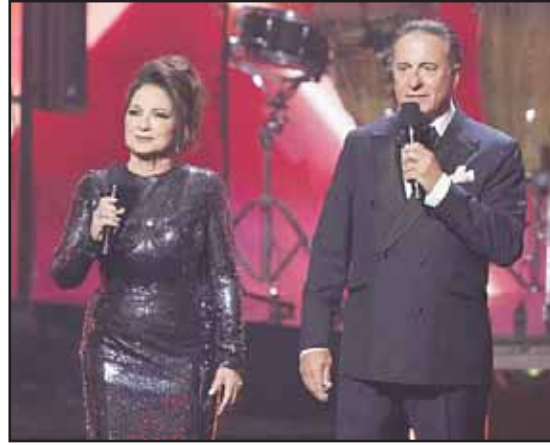
Gloria Estefan and Andy Garcia speak during the Latin Grammy Award ceremony.