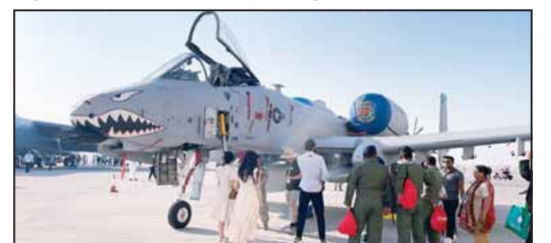
A number of aircraft participating in static displays at the Bahrain International Air Show.

The exhibition, which was held from November 13 to 15, witnessed a remarkable presence at the regional and international levels, as it displayed the latest products and technologies in the aviation industry with the participation of the largest international companies.