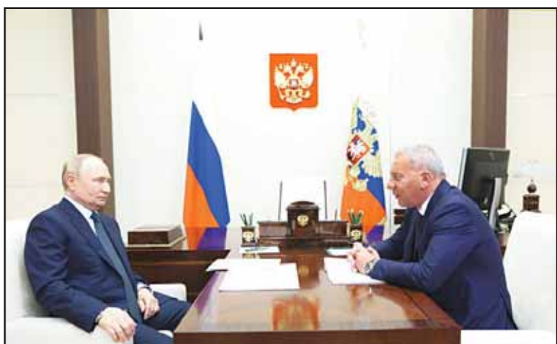
Russian President Vladimir Putin, (left), speaks with the head of Russian state space corporation Roscosmos Yuri Borisov during their meeting at Novo-Ogaryovo state residence outside of Moscow, Russia on Nov 15.

The immediate priority was to transfer the remaining uninjured residents to other facilities, he said, including one in the city of Huesca, about 90 kilometers (56 miles) away.