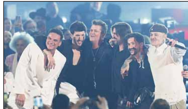
Carlos Vives performs during the 25th Latin Grammy Award ceremony.