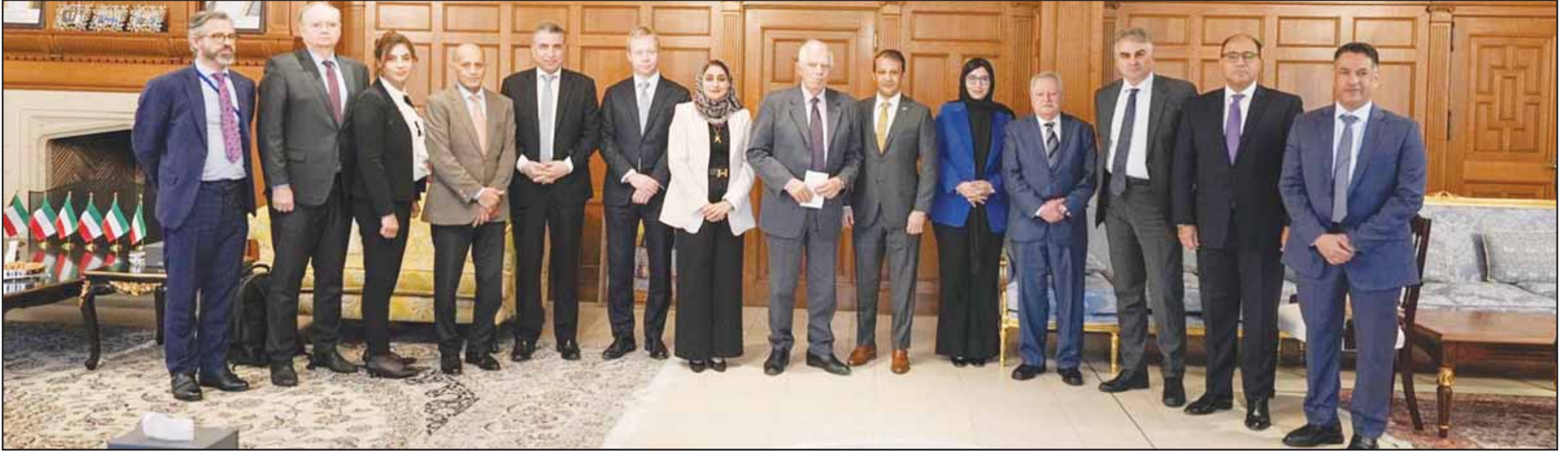
Kuwait Embassy officials with EU High Representative Josep Borrell and Gulf, Arab ambassadors accredited in Brussels.