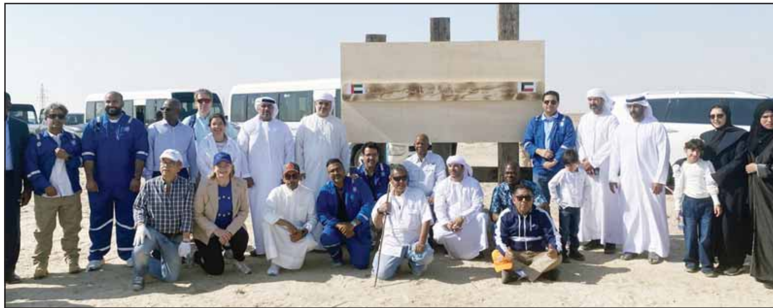
A group photo of the participants in the environmental initiative (Plant) in the Abdali Reserve.

The Bank is committed to supporting and financing all vital sectors in the Egyptian market, reflecting its belief in the significance of collaborative efforts to achieve national development plans and Egypt's Vision 2030, aimed at supporting economic stability and maximizing benefits for society as a whole.