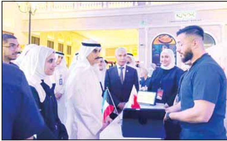
A photo from the event.