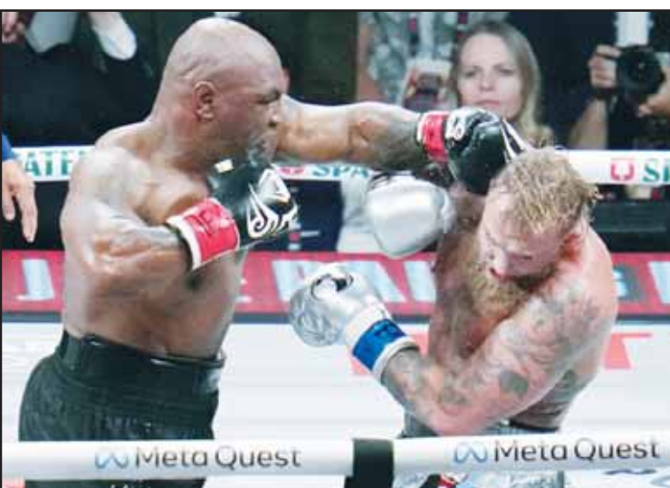
Mike Tyson hits Jake Paul during their heavyweight boxing match, Friday, Nov. 15, 2024, in Arlington, Texas.

It's a rematch of a disputed split decision won by Taylor in a slugfest at sold-out Madison Square Garden two years ago. Taylor and Serrano were the first women to headline a boxing event at the storied venue.