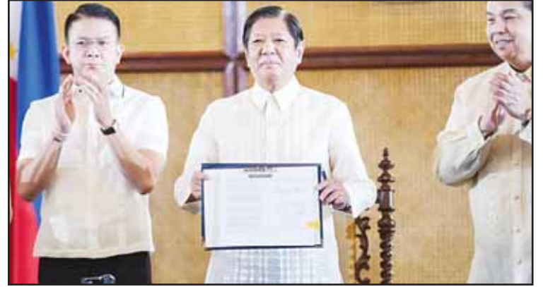
In this photo provided by the Malacanang Presidential Communications Office, Philippine President Ferdinand Marcos Jr. (center), holds a document beside Senate President Francis Escudero, (left), and House Speaker Martin Romualdez during the ceremonial signing of the Philippine Maritime Zones and Philippine Archipelagic Sea Lanes Act at the Malacanang presidential palace in Manila, Philippines, on Nov 8.

In 2013, Typhoon Haiyan, one of the strongest recorded tropical cyclones, left more than 7,300 people dead or missing, flattened entire villages and caused ships to run aground and smash into houses in the central Philippines.