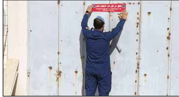
A storehouse is sealed by the fire department.

— Compiled by PFX Fernandes/Mahmoud Attiye