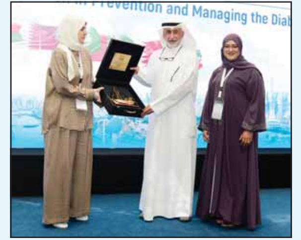
Representative of the Minister of Health, Dr. Ahmed Asad being honored at the 7th Gulf Conference on Diabetic Foot Care.

Dr. Bin Nakhi also stressed the need for a specific protocol for the GCC countries that includes preventive methods and best practices for managing diabetic foot diseases and their complications.