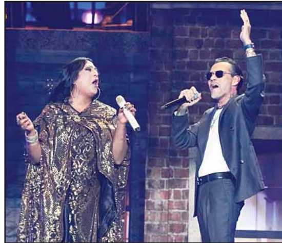
Marc Anthony and La India perform during the 25th Latin Grammy Awards ceremony.