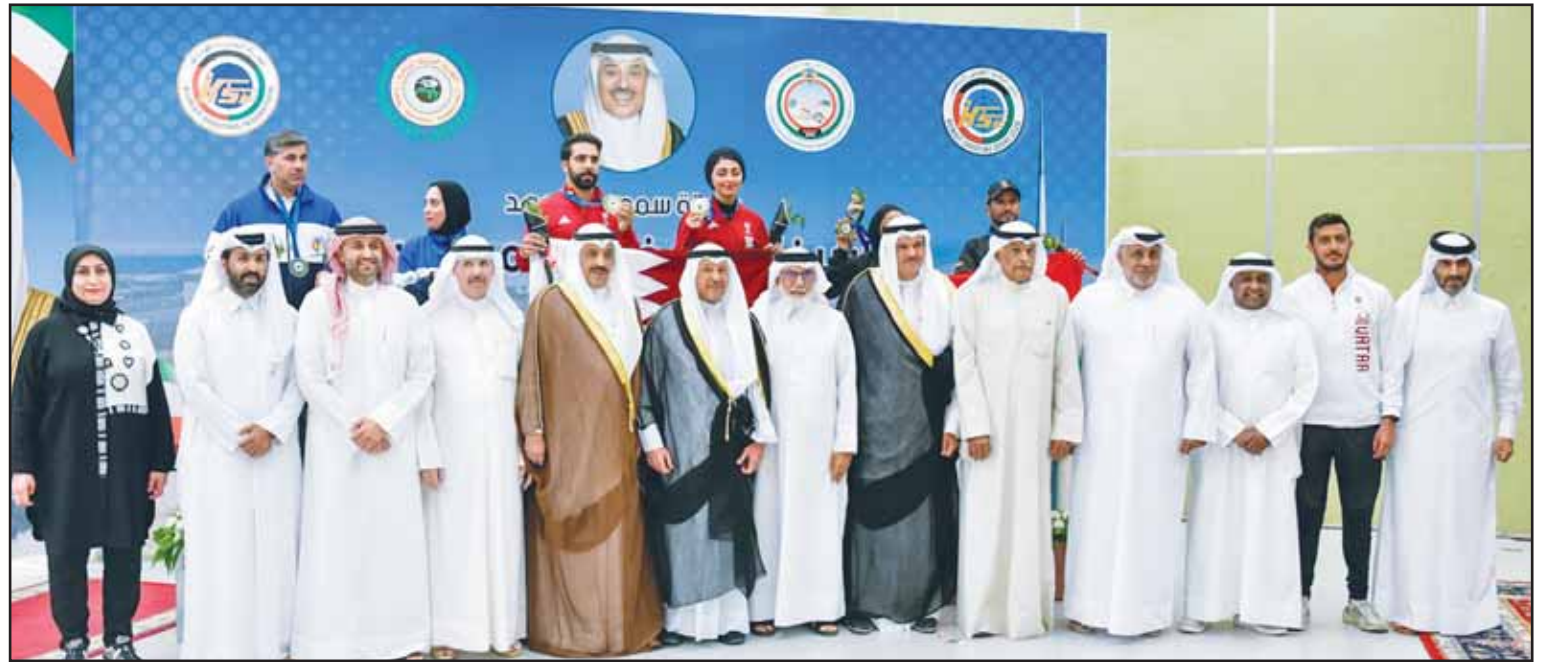
Crowning the winners of the mixed doubles skeet shooting competition.