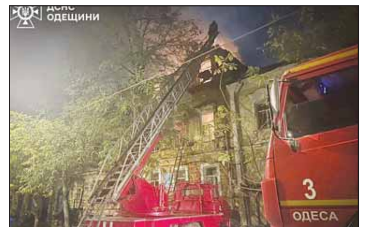
In this photo provided by the Ukrainian Emergency Service, emergency services personnel work to extinguish a fire following a Russian attack in Odesa, Ukraine, on Nov 14. (AP)

According to US, South Korean and Ukrainian intelligence assessments, up to 12,000 North Korean troops have been sent to Russia as part of a major defense treaty between the countries.