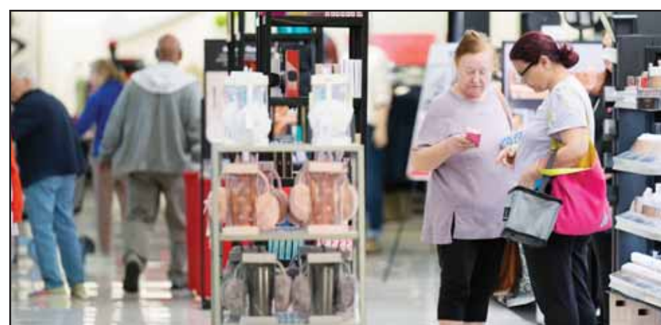
Shoppers peruse merchandise at a Kohl's department store in Ramsey, N.J., Oct. 10, 2024. (AP)

WASHINGTON, Nov 16, (AP): Americans stepped up their spending at retailers last month in the latest sign that healthy consumer spending is driving the economy's steady growth.