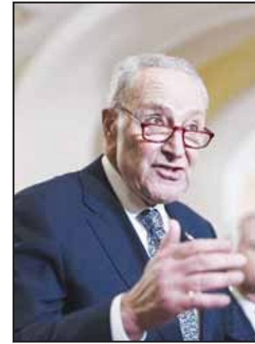
US Senate Majority Leader Chuck Schumer, speaks with reporters at the Capitol in Washington on Nov 13.