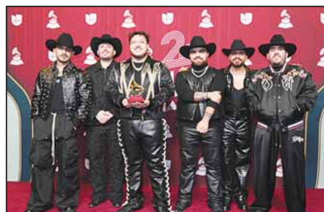
Grupo Frontera poses after winning an award for best norteno album.