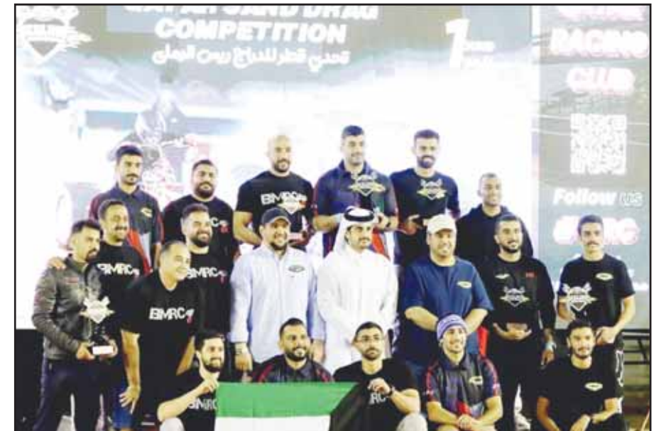
Basil Al-Sabah Club racers take podium spots in Qatar Sand Drag race.

The first round of the Qatar Sand Drag Race Championship kicked off today, Thursday, and the competitions will continue until April 2025, with wide participation from car and motorcycle racing champions.