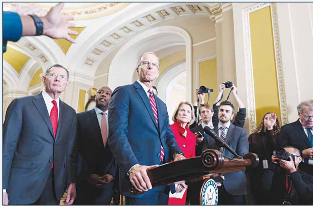
US Senate Minority Whip John Thune, joined (at left) by Sen John Barrasso, meets with reporters after he was elected to succeed longtime GOP leader Mitch McConnell of Kentucky, at the Capitol in Washington on Nov 13.