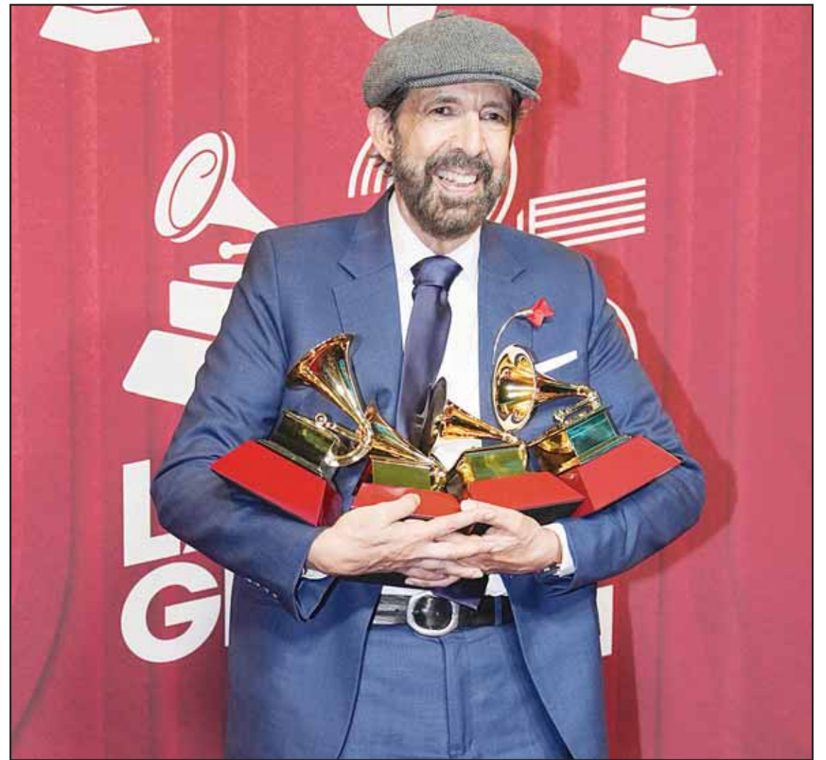
Juan Luis Guerra poses with four awards at the 25th Latin Grammy Awards ceremony, Thursday, Nov. 14, 2024, in Miami.