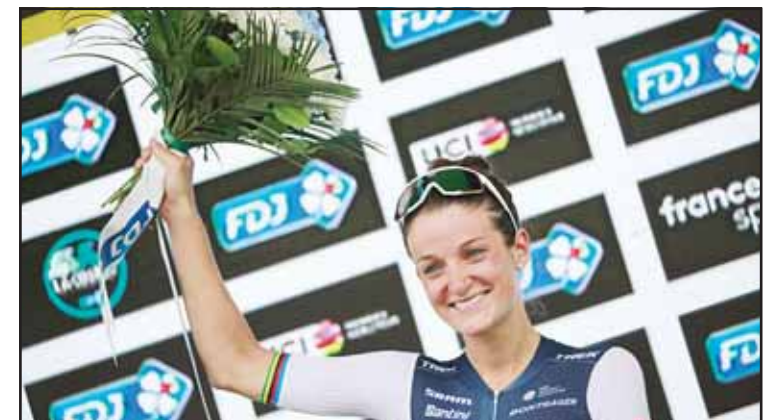
Elizabeth 'Lizzie' Deignan celebrates on the podium winning La Course by Le Tour de France women's cycling race, in Nice, southern France, Aug. 29, 2020.

Monmouth is at Wichita State on Monday night. Rutgers hosts Merrimack on Wednesday night.