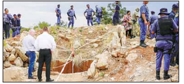
Police officers and private security personnel stand by the opening of a reformed gold mineshaft where illegal miners are trapped in Stilfontein, South Africa on Nov 15.

Zamora, founder of El Peridico newspaper, had spent more than two years in jail awaiting trial before a judge granted him house arrest in October. Prosecutors appealed the order and on Friday another court ordered the 68-year-old journalist to continue waiting in jail.