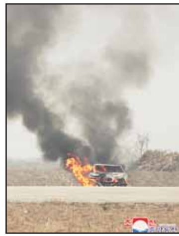
This photo provided by the North Korean government shows a burning vehicle during tests of drones designed to crash into targets, at an undisclosed location in North Korea on Nov 14.

KCNA paraphrased Kim as saying drones were easy to make at