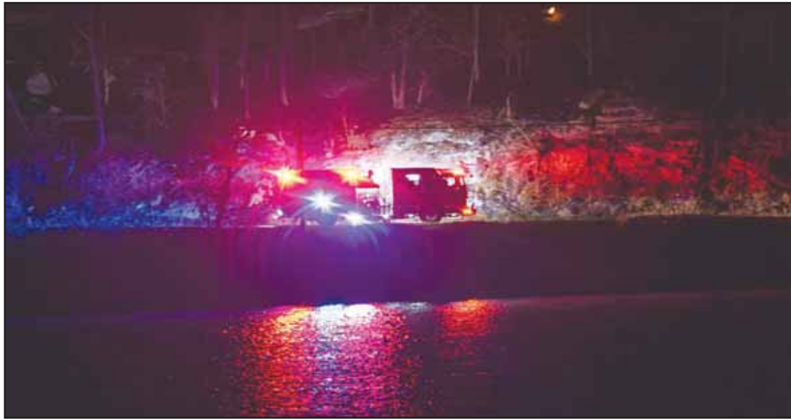
Firefighters attend to the wildfires as they burn along the New York and New Jersey border in Greenwood Lake, New York on Nov 13.