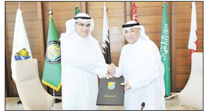
Officials exchanging the signed documents.

The ambassador also affirmed Kuwait's readiness to chair the GCC's work starting in December and its eagerness to work closely with the EU to implement the outcomes of the Gulf-European summit, which addressed various areas of cooperation and coordination between the two sides.