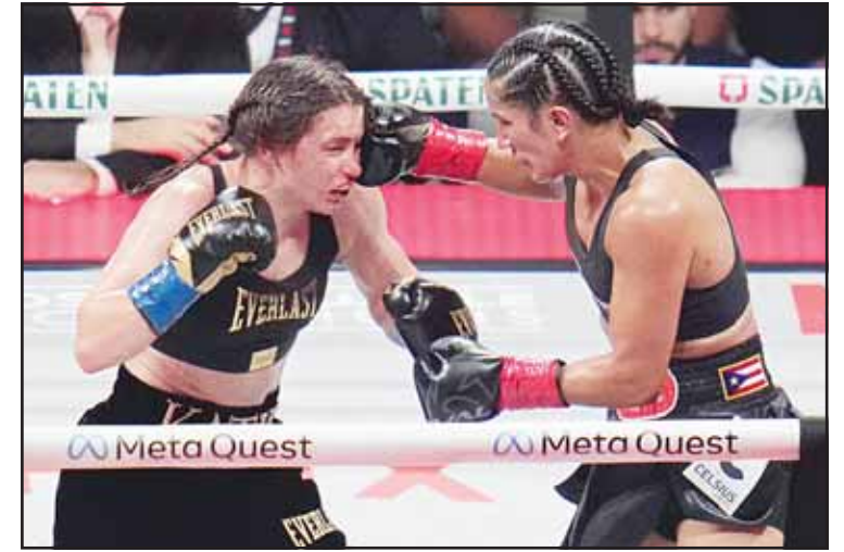
Amanda Serrano hits Katie Taylor during their undisputed super lightweight title bout, Friday, Nov. 15, 2024, in Arlington, Texas.

Taylor was fighting for the first time since avenging her only professional loss by beating Chantelle Cameron for the undisputed super lightweight title in a rematch in her home country a year ago.