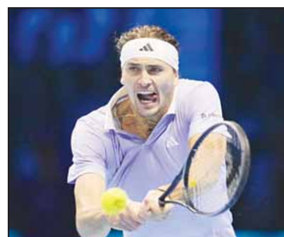
Germany's Alexander Zverev returns the ball to Spain's Carlos Alcaraz during their singles tennis match of the ATP World Tour Finals at the Inalpi Arena, in Turin, Italy, Friday, Nov. 15, 2024.

"He turns into a different person. He really plays his best at the most important moments," Zverev said. "The last game was the most entertaining game of the