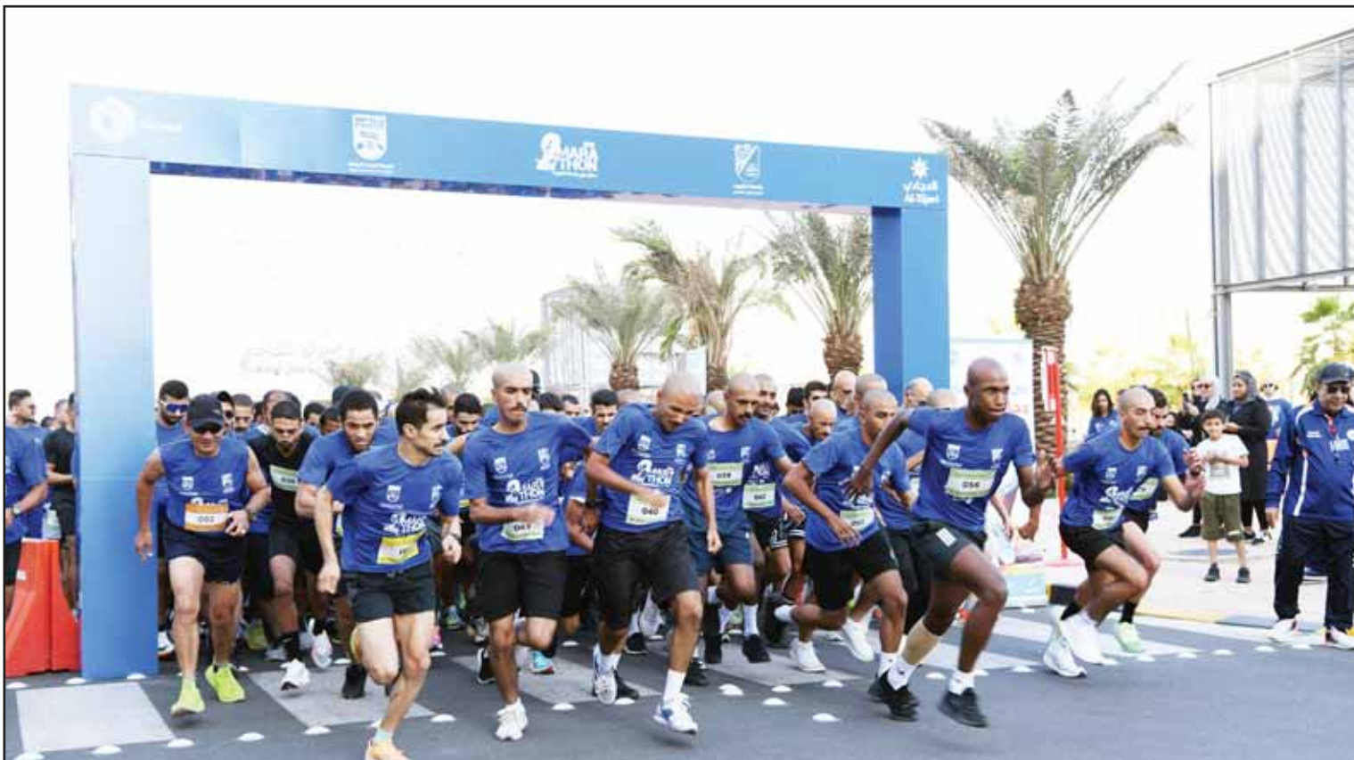
Photo during the start of the second marathon at a distance of 5 km.

Outstanding athletes will be recognized and celebrated during a special awards ceremony.