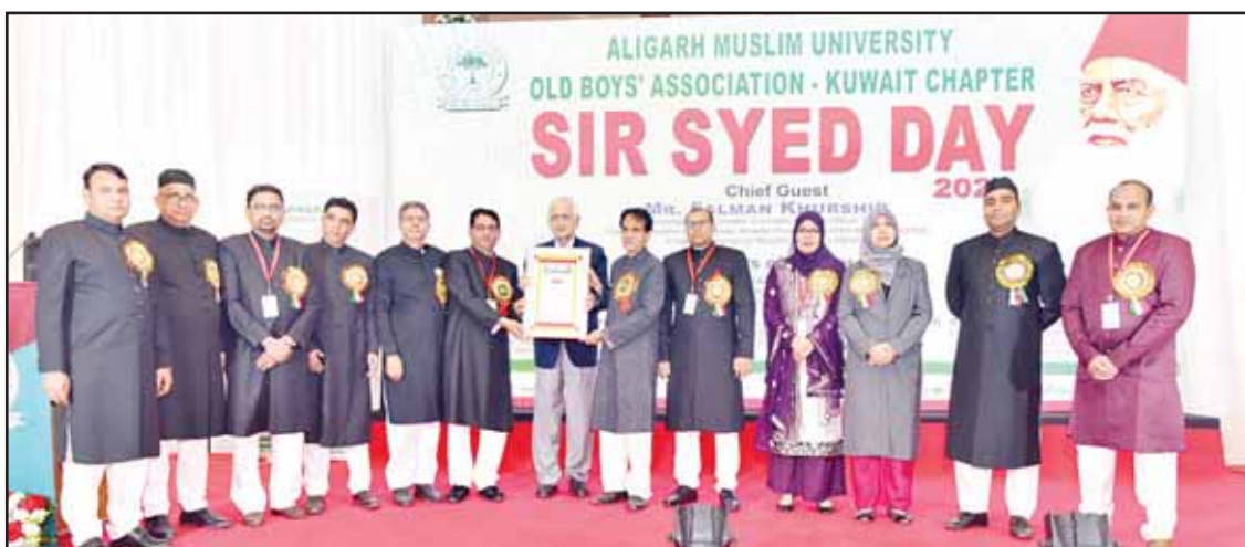
A group photo from the event.