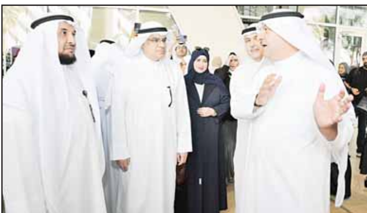
Photos from the Student Talent &amp; Innovation Forum and exhibition.

Since 2004, Toyota has inspired nearly 9.4 million children from 144 countries to unleash their creativity and enjoy having a dream. This contest inspires the next generation of inventors, thinkers, and dreamers to have unlimited imaginations and make the world a better place. ALSAYER promotes Toyota DCAC to help young talents from Kuwait to learn new skills, be innovative and express creativity which covers relevant sustainability development goals as part of our Corporate Sustainability & Responsibility objectives.