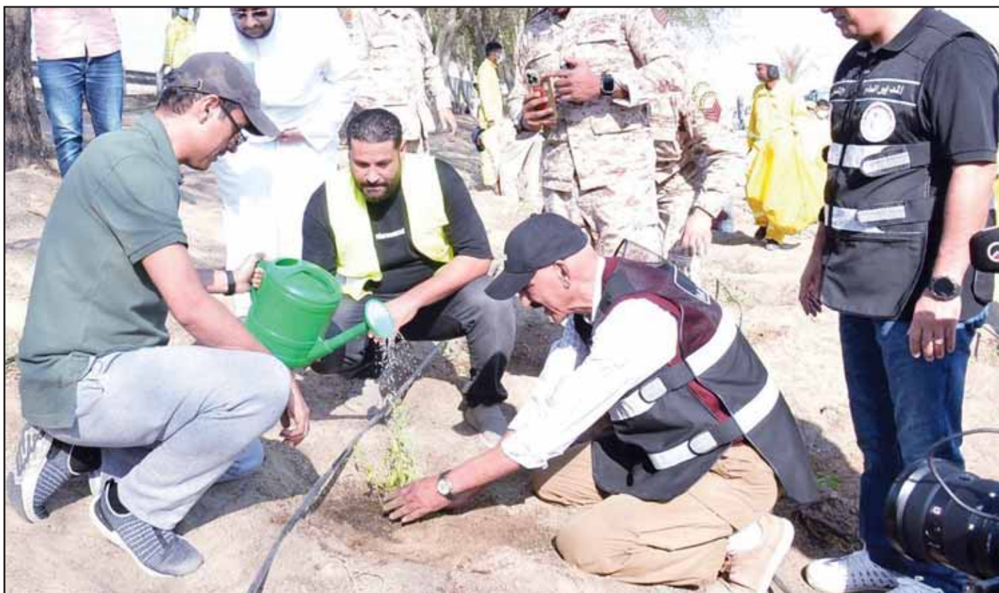
Minister of Electricity, Water and Renewable Energy Dr. Mahmoud Abdulaziz Bushehri joins Ahmadi Governor Sheikh Humoud Jaber Al-Ahmad Al-Sabah in a tree-planting campaign along the highways of Ahmadi Governorate, collaborating with state institutions and civil societies to promote environmental sustainability. — See Page 2