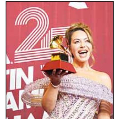
Chiquis poses after winning an award for best banda album.