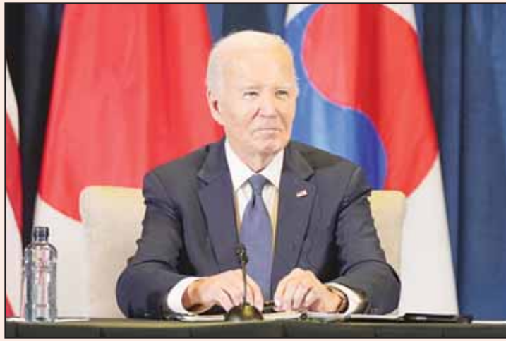
US President Joe Biden listens during a trilateral meeting with the Prime Minister of Japan Shigeru Ishiba and the President of South Korea Yoon Suk Yeol in Lima, Peru, on Nov 15.

A three-day exercise in June was geared toward improving joint ballistic missile defense, anti-submarine warfare, surveillance and other skills and capabilities and to help the three countries improve their ability to share missile