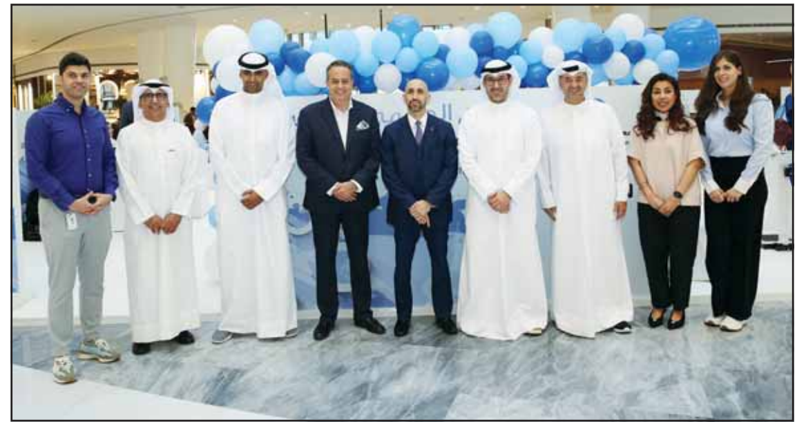
A group photo from the event.