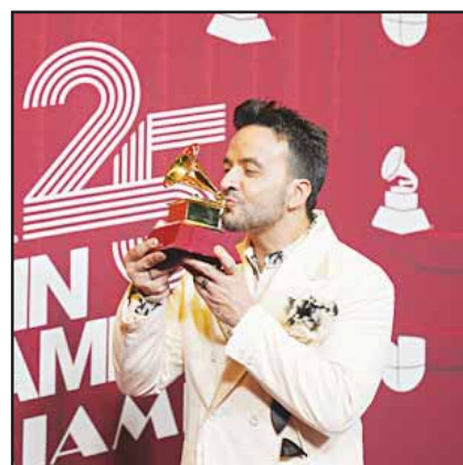
Luis Fonsi poses after winning an award.