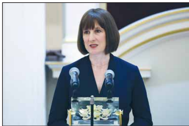
Chancellor of the Exchequer Rachel Reeves delivers her first Mansion House speech on financial services in the City of London, during the Financial and Professional Services Dinner, in the Egyptian Hall of Mansion House, on Nov. 14, 2024.