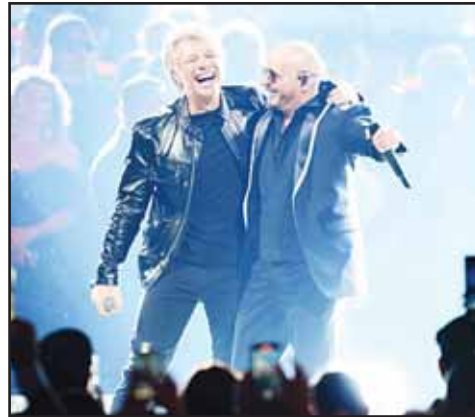
Pitbull and Jon Bon Jovi perform at the Latin Grammy Awards ceremony.