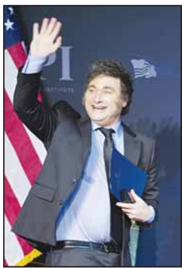
Argentina's President Javier Milei arrives to speak before President-elect Donald Trump during an America First Policy Institute gala at his Mar-a-Lago estate on Nov 14, in Palm Beach, Fla.

Milei criticized a political ruling class that he said was responsible for a system that used unfair tax systems