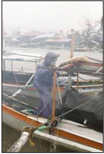
A man tries to secure his boat as rain caused by Typhoon Usagi pours at Santa Ana, Cagayan province, northern Philippines on Nov 14.

Usagi made landfall in the northeastern Philippines on Thursday, just two days after the last typhoon, Toraji, exited after setting off floods and forcing more than 82,500 people to flee