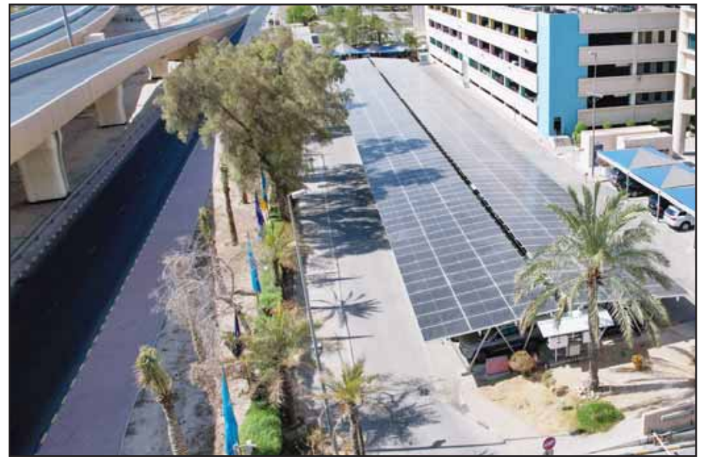
Zain solar panel setup

Through its corporate sustainability and social responsibility strategy, Zain is committed to building climate change scenarios that are aligned with the Paris Agreement (2015) to reduce carbon emissions