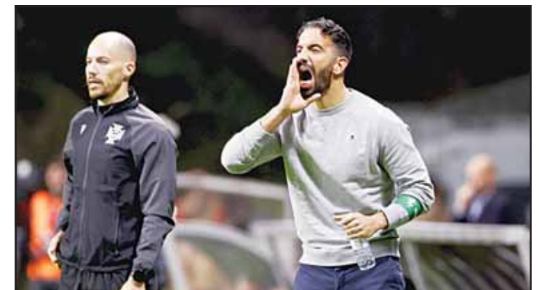
Sporting's head coach Ruben Amorim shouts instructions during the Portuguese league soccer match between SC Braga and Sporting CP at the Municipal stadium in Braga, Portugal, Sunday, Nov. 10, 2024.