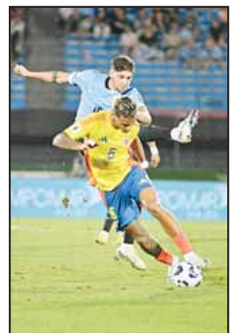
Colombia's Richard Rios (6) and Uruguay's Federico Valverde battle for the ball during a qualifying soccer match for the FIFA World Cup 2026 in Montevideo, Uruguay, on Nov. 15, 2024.

Bielsa has been under fire since October, when just-retired striker Luis Suárez criticized him for the way he treated players during the Copa America, saying the "friction" hurts. Other Uruguay players did not defend their coach from the criticism, and Bielsa himself admitted his grasp over the team was shaken.