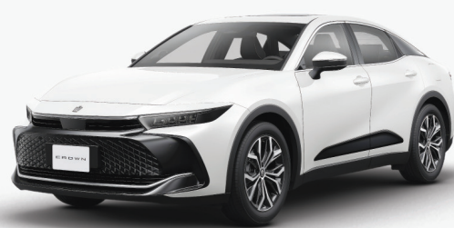
TOYOTA CROWN (MY 2023)

VIN:JTDACABF5P3000880 TO JTDFAFAAFOP3003890