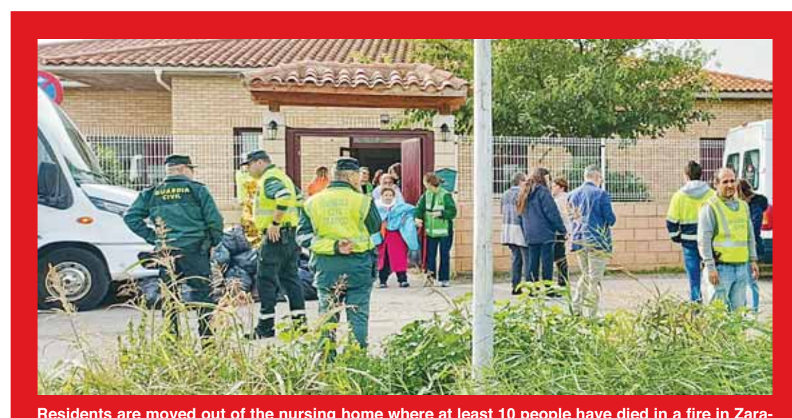
Residents are moved out of the nursing home where at least 10 people have died in a fire in Zaragoza, Spain on Nov 15.

Milei first met Trump in February at the Conservative Political Action Conference, or CPAC, in the Washington area.