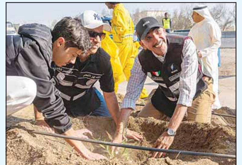
Minister of Electricity, Water and Renewable Energy, Dr. Mahmoud Boushehri, participates in planting seedlings.