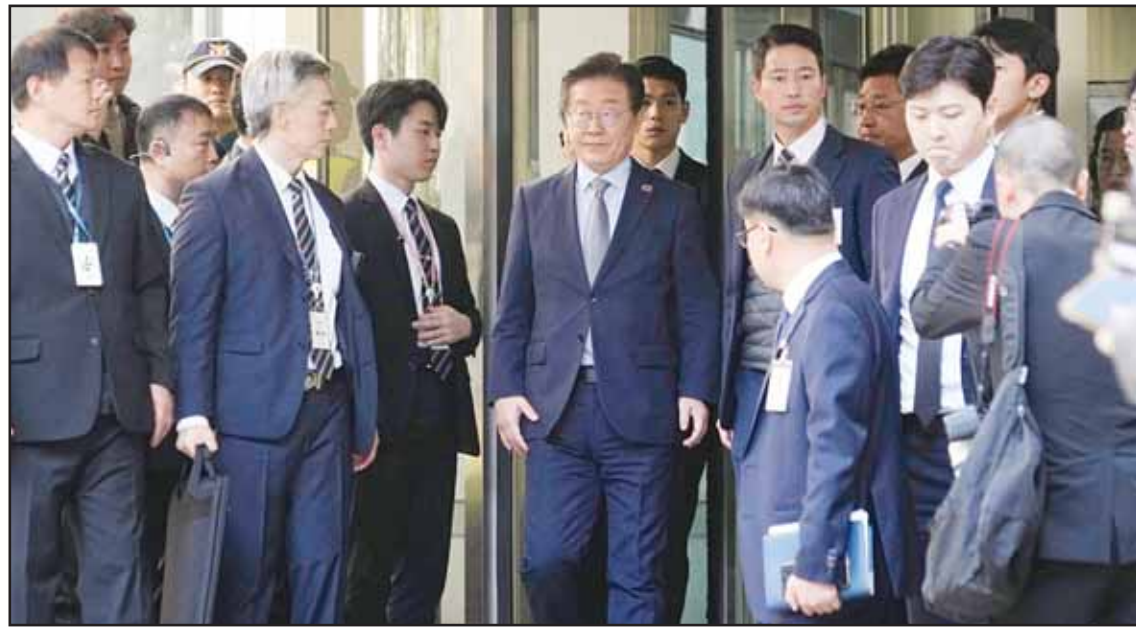
South Korea's main opposition Democratic Party leader Lee Jae-myung, (center), leaves the Seoul Central District Court in Seoul, South Korea on Nov 15.

The introduction of North Korean troops to the Russia-Ukraine conflict comes as Moscow has seen a favorable shift in momentum. Trump has signaled that he could push Ukraine to agree to give up some land seized by Russia to find an end to the conflict.