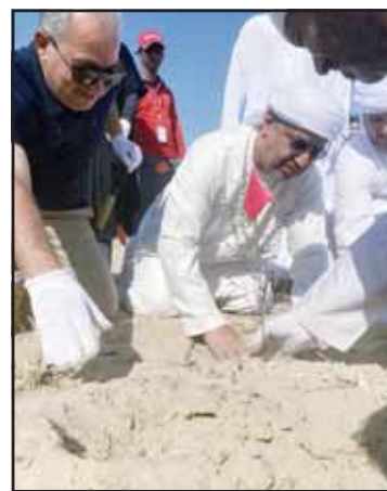
The Emirati ambassador while planting a plant in the Abdali Reserve.

He affirmed Kuwait and UAE's keenness to boosting sustainable ef-