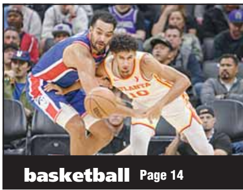
basketball Page 14