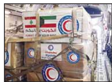
Kuwait’s fourth air bridge relief plane arrives in Beirut, Monday, loaded with 40 tons of food and blankets.

Program seeks to transform Kuwait into investment hub