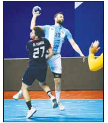
Al-Salmiya seeks to strengthen its lead in the league.

The league follows a single-round format in its preliminary stage. The top six teams will advance to the