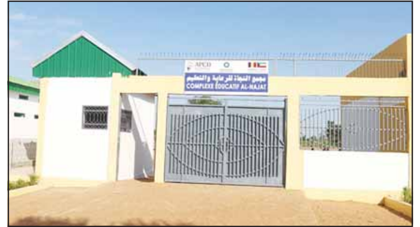
Al-Najat Complex for orphans for the education and rehabilitation of orphans in Chad.

His Highness the Prime Minister Sheikh Ahmad Abdullah Al-Ahmad Al-Sabah too sent a cable to Prince Albert II to congratulate him on the occasion.