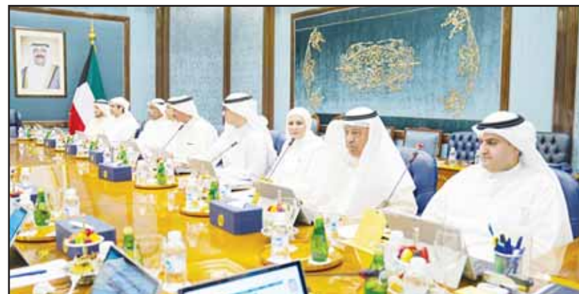
Photos capture the Cabinet meeting in progress, with Acting Prime Minister, Minister of Defense, and Interior Minister Sheikh Fahad Yousef Saud Al-Sabah presiding over the weekly session on Tuesday.