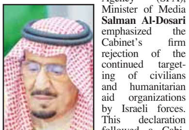
King Salman bin Abdulaziz. Two Holy Mosques

RIYADH: The Saudi Cabinet convened on Tuesday and urged the international community to fulfill its responsibilities regarding the ongoing violations of the Israeli occupation against the Palestinian people. In a statement released by the Saudi Press Agency (SPA), Minister of Media Salman Al-Dosari emphasized the Cabinet’s firm rejection of the continued targeting of civilians and humanitarian aid organizations by Israeli forces. This declaration followed a Cabinet session chaired by Custodian of the