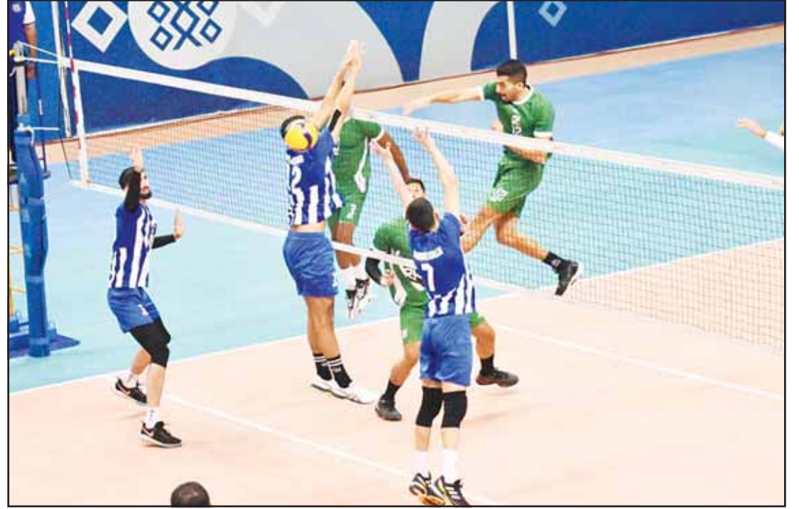
Players vie for the ball during the Federation Championship.

The second match saw Al-Arabi engage in a fierce battle with Al-Shabab. Al-Shabab took the first set 25-23, but Al-Arabi leveled the score by winning the second set 25-21. Al-Shabab regained the lead with a 25-20 win in the third set, but Al-Arabi fought back to take the fourth set 25-19, forcing a tiebreaker. The decider was a nail-biter, with Al-Arabi clinching it 17-15 to secure its first win of the championship.