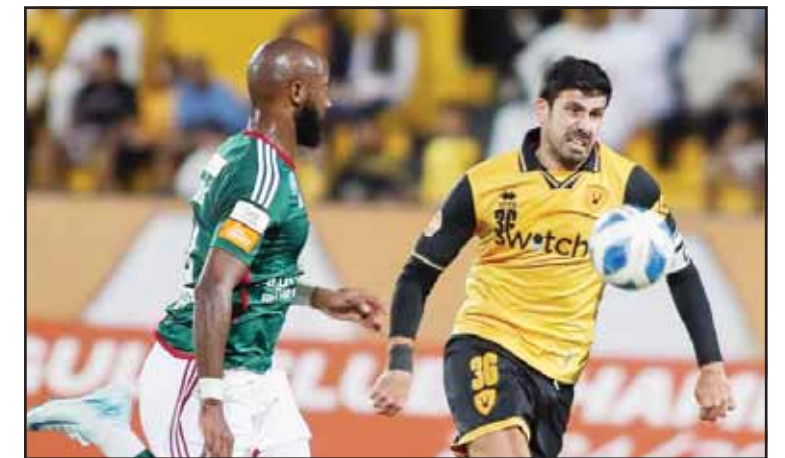
A file photo of players in action.

Al-Qadsiya and Kuwait Club intensify preparations for regional challenges