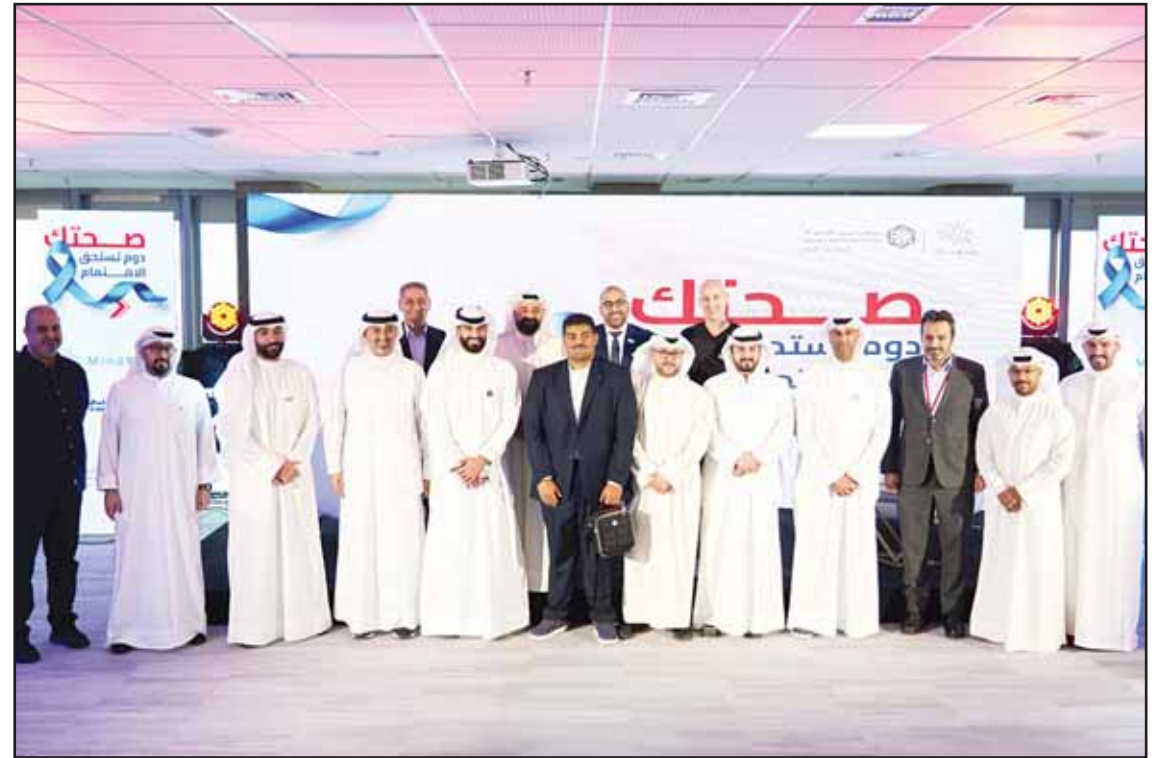
Gulf Bank officials during 'Movember' campaign.

In alignment with Kuwait Vision 2035, "New Kuwait," and its commitment to fostering collaborative partnerships, Gulf Bank is dedicated to driving robust sustainability initiatives across environmental, social, and governance (ESG) dimensions. The bank is committed to implementing strategically selected and diverse sustainability programs both internally and externally.