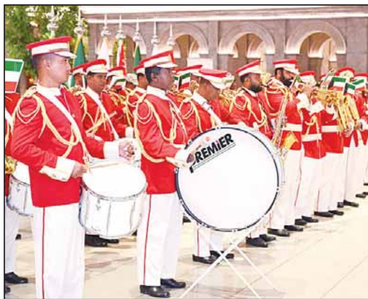
Band members perform during the musical show held at the Avenues.