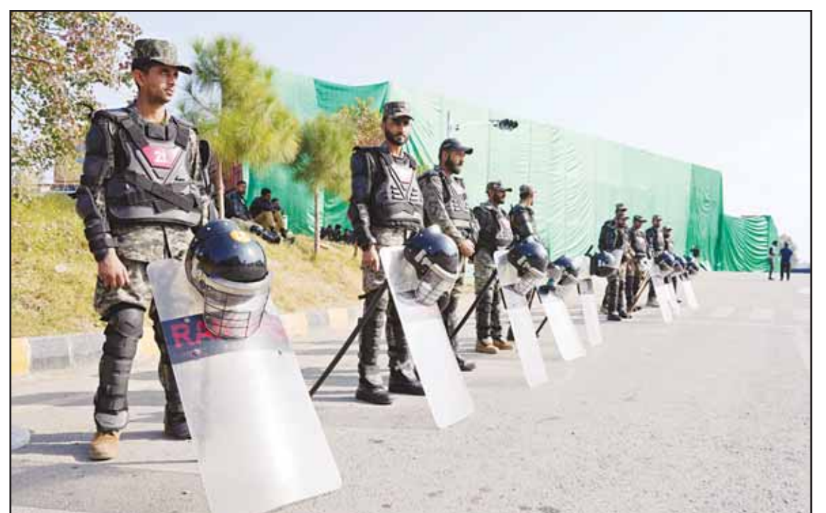
Paramilitary soldiers stand guard with riot gears at a road barricaded with shipping containers ahead of a planned rally by supporters of imprisoned former Prime Minister Imran Khan's Pakistan Tehreek-e-Insaf party, in Islamabad, Pakistan on Nov 24. (AP)

"In Colombia, we will stop the coup d'état," he wrote on X. (AP)