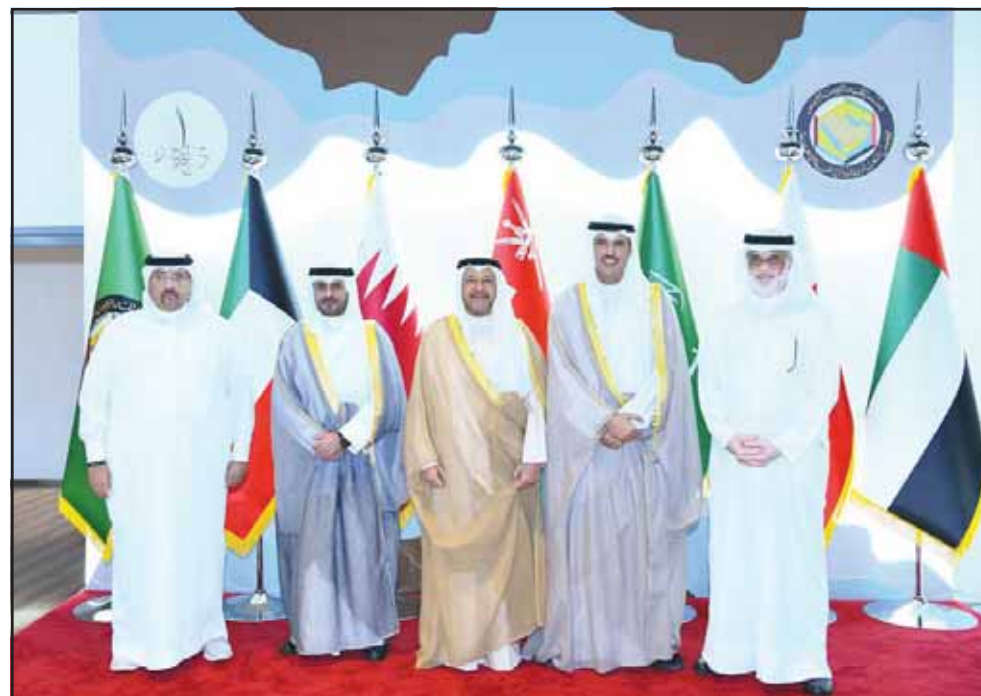
The governors and officials at the Abdullah Al-Salem Cultural Center.