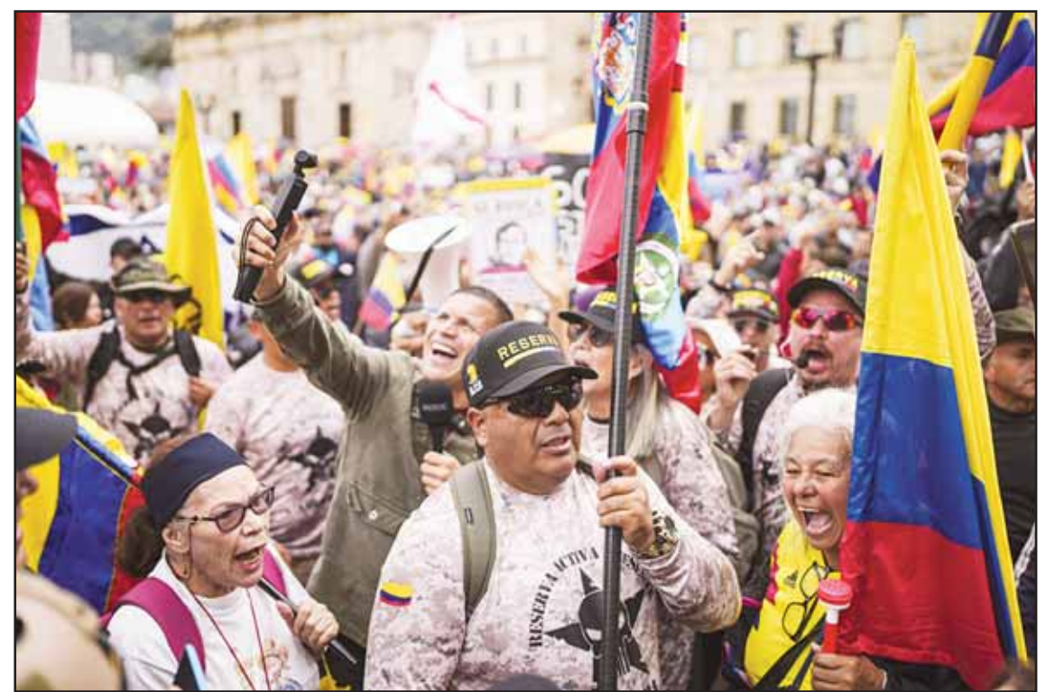
Demonstrators march against the government of President Gustavo Petro, in Bogotá, Colombia on Nov 23.

China objects strongly to such US stopovers by Taiwan's leaders, as well as visits to the island by leading American politicians, terming them as violations of US commitments not to afford diplomatic status to Taiwan after Washington switched formal recognition from Taipei to Beijing in 1979.