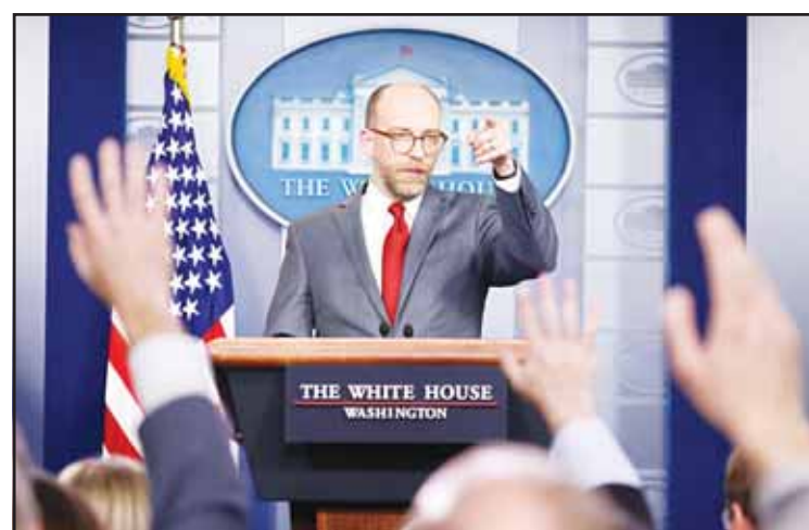
Acting OMB Director Russel Vought speaks during a press briefing at the White House, March 11, 2019, in Washington.