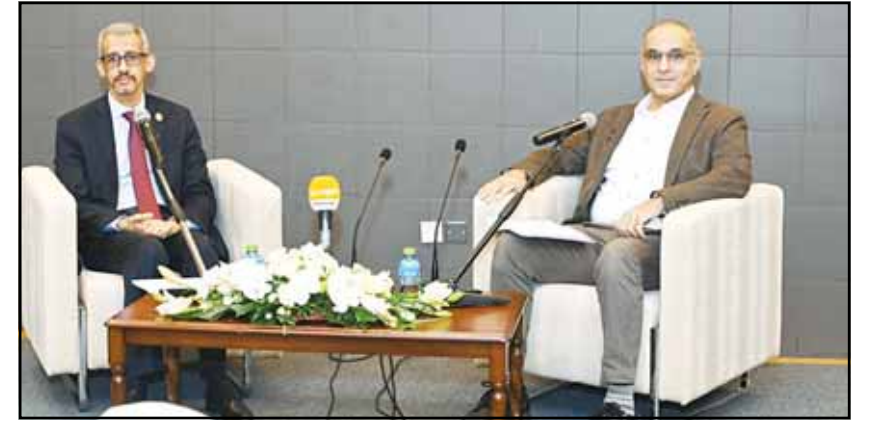
A photo from the discussion.

ing cultural collaboration across the Arab world. He noted that while a city is chosen as the capital of culture each year, Jerusalem remains the permanent capital. He affirmed ALECSO's dedication to developing vibrant cultural spaces that support social integration and enrich local communities.