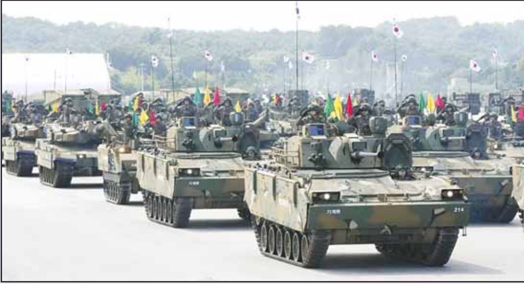
South Korean mechanized unit personnel parade with their armored vehicles during the media day for the 76th anniversary of Armed Forces Day at Seoul air base in Seongnam, South Korea on Sept 25. (AP)

SEOUL, South Korea, Nov 24, (AP): Russia has supplied air defense missile systems to North Korea in exchange for sending its troops to support Russia's war efforts against Ukraine, a top South Korean official said Friday.