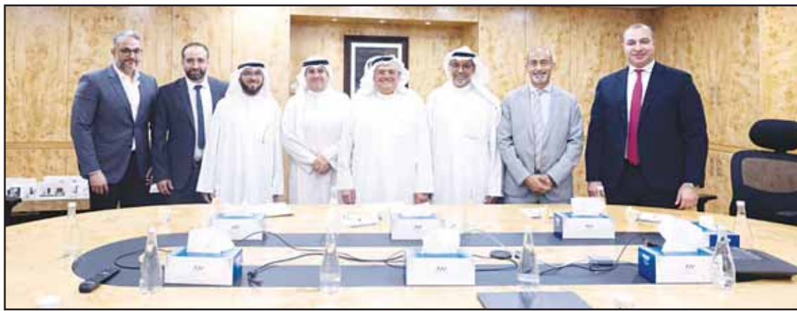
A group photo from the cooperation agreement signing between Ali Abdulwahab Al-Mutawa Commercial Company and the Kuwaiti Cancer Patients Care Society.

The deal is seen as a step toward helping countries on the receiving end create more ambitious targets to limit or cut emissions of heat-trapping gases that are due early next year. It's part of the plan to keep cutting pollution with new targets every five years, which the world agreed to at the U.N. talks in Paris in 2015.