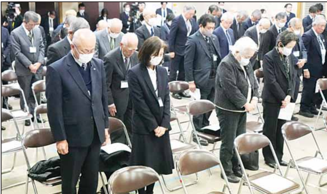
Guests offer a moment of silence during a memorial ceremony for the Sado Island Gold Mine in Sado, Niigata prefecture, Japan on Nov 24.

SADO, Japan, Nov 24, Japanese officials on Sunday paid tribute to workers at the country's Sado Island Gold Mines but offered no apology over Japan's wartime use of Korean forced laborers, highlighting lingering tensions between the neighbors over the issue.