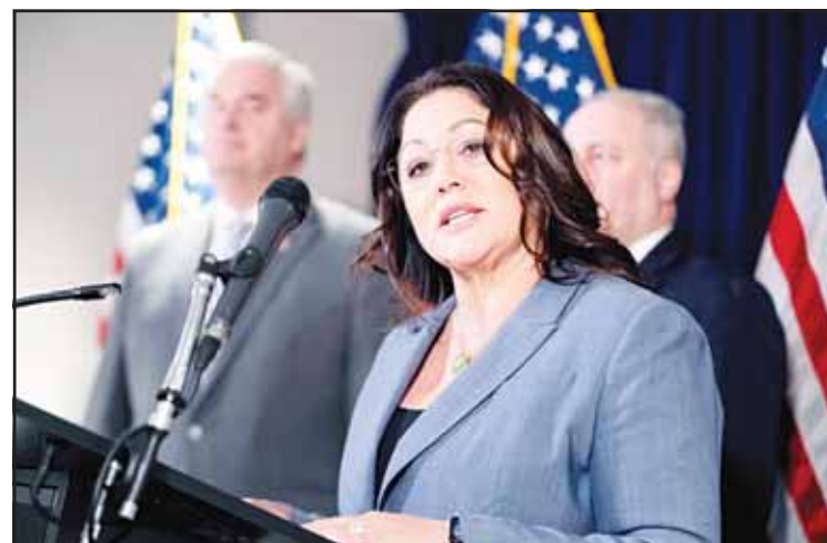
Rep. Lori Chavez-DeRemer, R-Ore., accompanied by Majority Whip Rep. Tom Emmer, R-Minn., left, and House Majority Leader Rep. Steve Scalise, R-La., right, speaks at a news conference on Capitol Hill in Washington, Jan. 25, 2023.

stands at $35.94 trillion, with both the Trump and Biden administrations having added to it. Trump's policies added $8.4 trillion to the national debt, while the Biden administration increased the national debt by $4.3 trillion, accord-