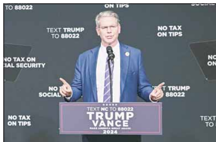
Investor Scott Bessent speaks on the economy in Asheville, N.C., Aug. 14, 2024.