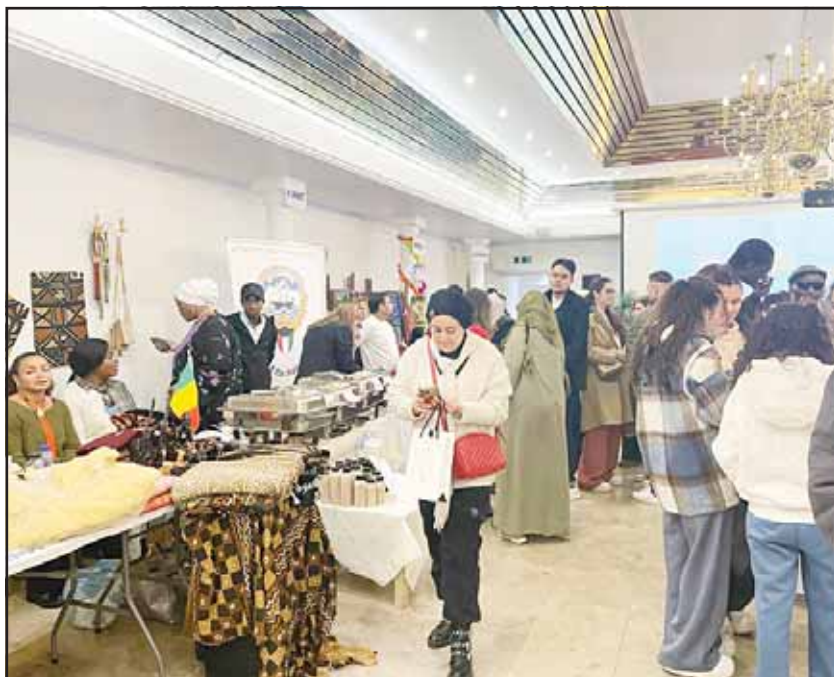
Traditional items at the Kuwait embassy pavilion.

It is worth mentioning that the award's closing ceremony saw the honoring of twenty winners across its four categories. Also, the organizing teams, the arbitration committees, and the winners of the Best Electronic Application Serving the Quran were also honored.