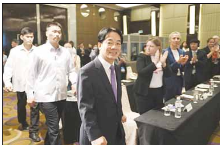
Taiwanese President Lai Ching-te, center, arrives to speak at a gathering of the largest delegation of foreign lawmakers to visit Taiwan in Taipei, Taiwan on July 30.

China has sought to whittle away traditional alliances in the South Pa-