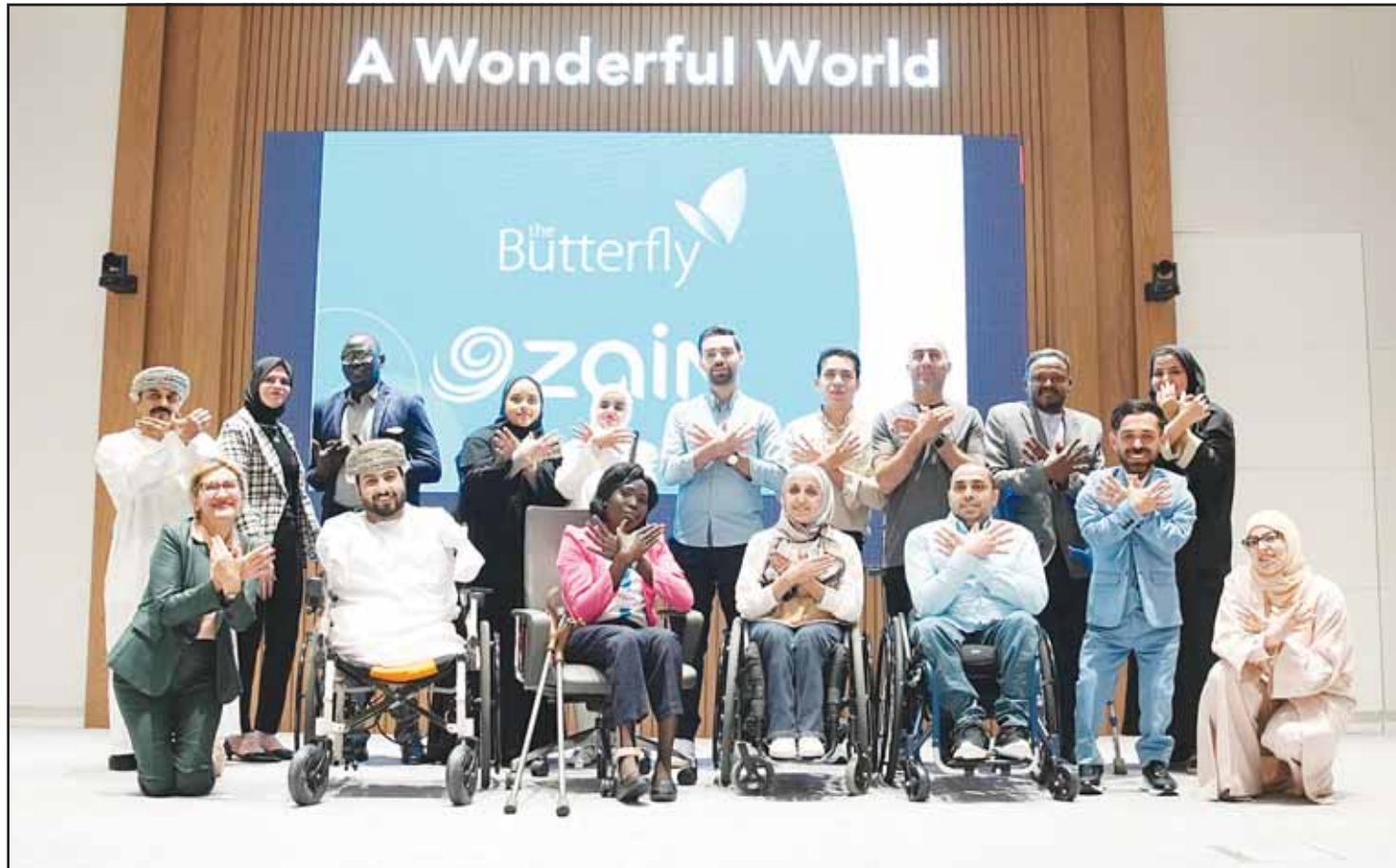
Zain 'The Masters' group photo.

This never-before-seen opportunity for people with disabilities soon follows Zain's establishment in September, 2024, of the first Corporate Employee Resource Group (ERG) in the region, specifically for individuals with disabilities. Partnering with PurpleSpace – the networking and professional hub for disabled employees – this partnership signifies a commitment by Zain to create an ERG experience that goes beyond traditional practices,