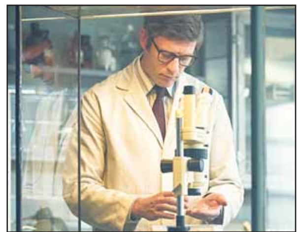
This image released by Netflix shows James Norton in a scene from 'Joy.'

Purdy, a single woman as the swinging '60s lead to the '70s, is exiled by her own pious mother - "You can't play God with this," the elder woman tells her daughter