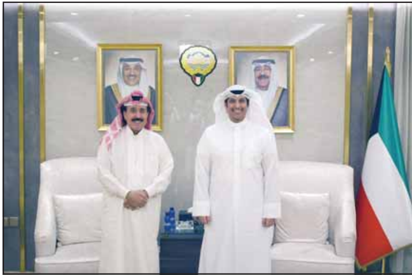
The Minister of Information Abdul Rahman Al-Mutairi meets Editor-in-Chief of the Arab Times and Al-Seyassah newspapers Ahmed Al-Jarallah.