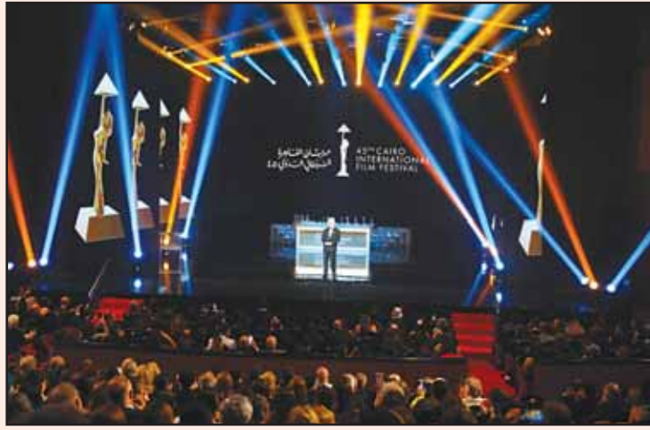
People attend the closing ceremony of the 45th edition of the Cairo International Film Festival (CIFF) in Cairo, Egypt, Nov. 22, 2024.

Family won the Network for the Promotion of the Asia Pacific Cinema Award as the best Asian feature film at the 45th Cairo International Film Festival (CIFF) concluded here on Friday evening.