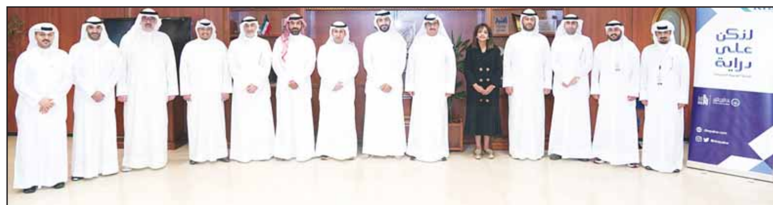
KIB and Co-Op Societies officials pose for a group photo.

For more information on the Bank's branches, products and services, please call the Burgan call center at 1804080, or visit the Bank's website www.burgan.com .