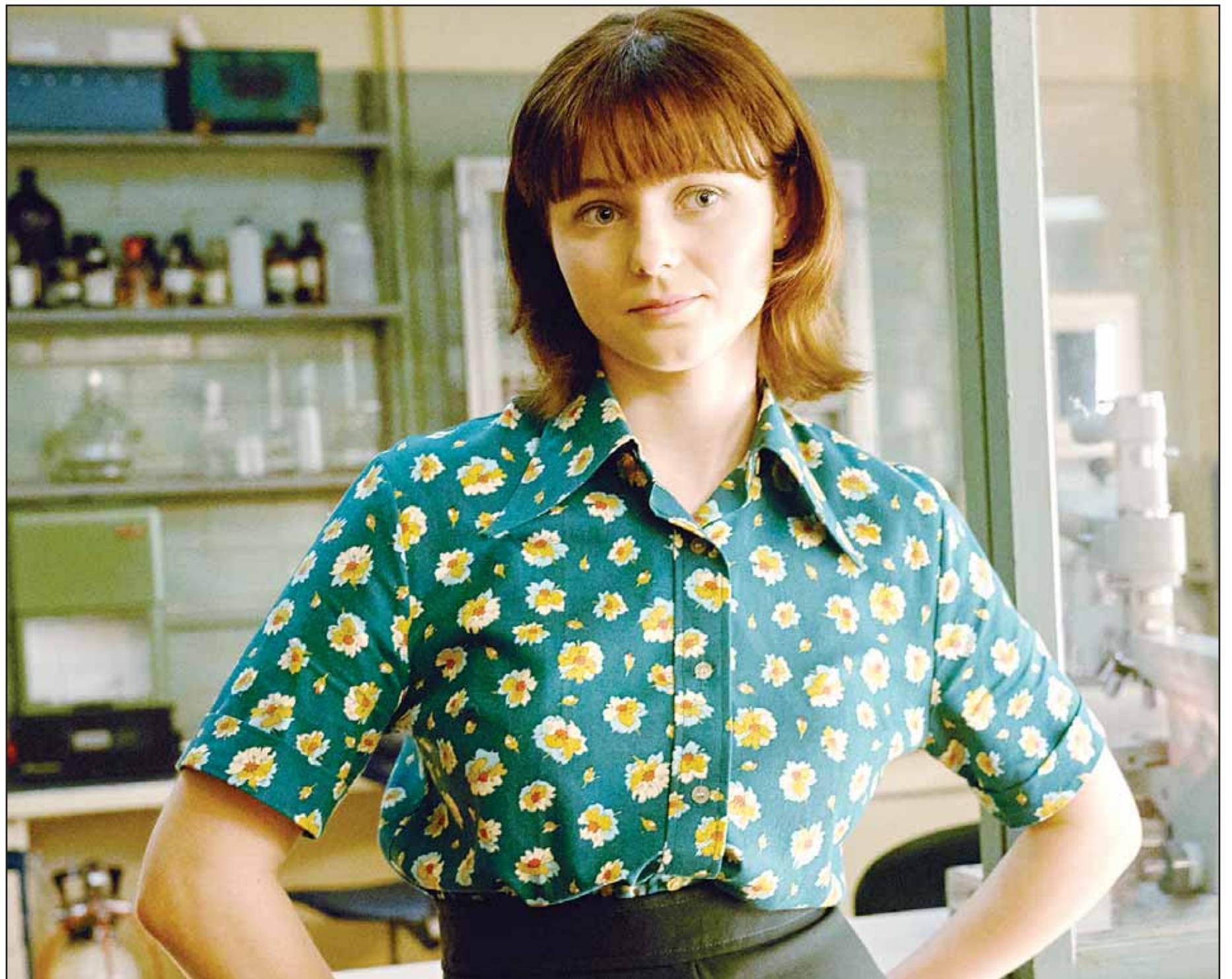
This image released by Netflix shows Thomasin McKenzie in a scene from 'Joy.'

Heartwarming true story of hope and persistence