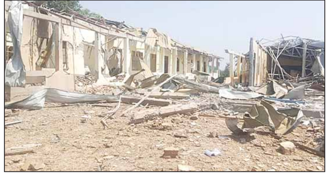
This handout photo provided by the Karen Human Rights Group shows debris of a school building destroyed by an army airstrike in Bilin township in Mon state, Myanmar on March 23. (AP)

UNITED NATIONS, Nov 24, (AP): Myanmar's desperate military junta is ramping up attacks on villages that have fallen to opposition groups, carrying out beheadings and torture, with women, children and the elderly among the victims, the UN independent human rights investigator for Myanmar said in a new report.