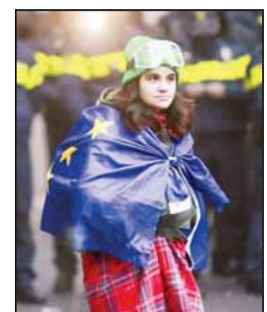
A woman holds an EU flag in front of police blocking the entrance of the Parliament's building during a rally to demand new parliamentary elections in the country, in Tbilisi, Georgia on Nov 25.

A 300-seat electoral college consisting of members of parliament, municipal councils and regional legislatures