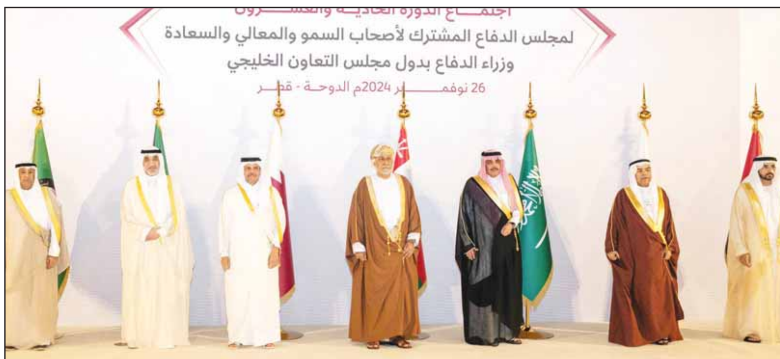
Kuwait's Acting Prime Minister, Defense and Interior Minister Sheikh Fahad Yousef Saud Al-Sabah poses for a group photo with his counterparts from the Gulf Arab region during the 21st session of the GCC Defense Ministers meeting in Doha on Tuesday.

600 workers traced to companies tied to accused