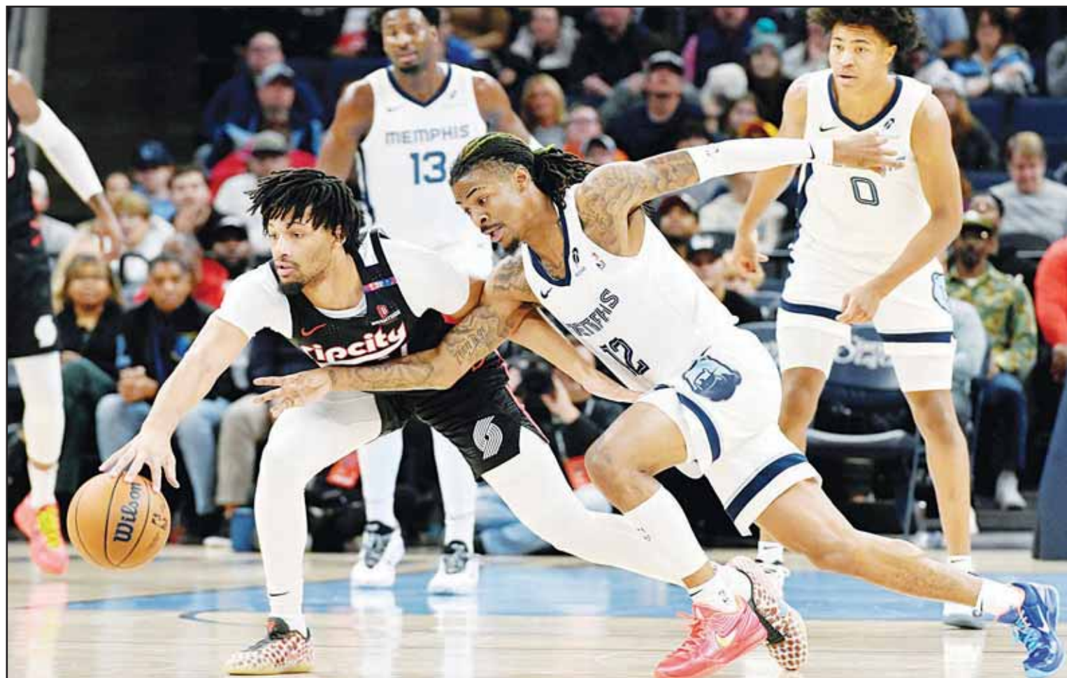
Portland Trail Blazers guard Shaedon Sharpe, left, and Memphis Grizzlies guard Ja Morant (12) struggle for control of the ball in the first half of an NBA basketball game in Memphis, Tenn.

Haliburton's tiebreaking 3 with 3:06 to go and Benedict Mathurin's alley-oop dunk off Haliburton's pass with a minute left finally secured the win.