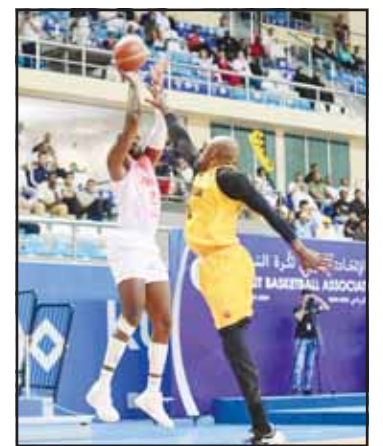
Al-Qadsia and Kuwait Club return to the basketball league action.