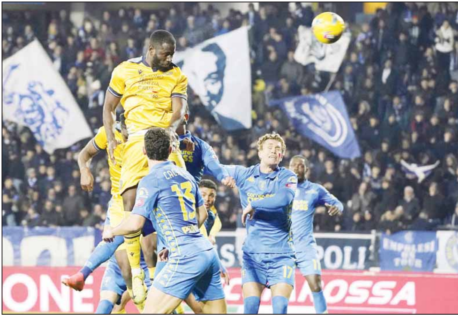
Udinese's Keinan Davis scores during the Serie A soccer match between Empoli and Udinese at the Carlo Castellani Stadium in Empoli, Italy.