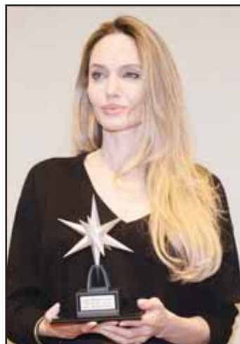
Angelina Jolie poses with the Star of the Mole award, in Turin, Italy, Sunday, Nov. 24.

The price increase is indicative of the value of live programming to media companies as viewers flee traditional television for streaming services, noted the report. (Xinhua)