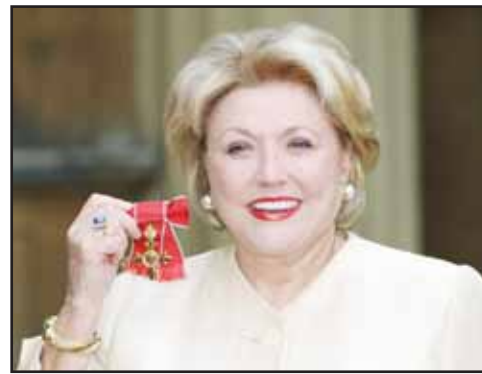
Author Barbara Taylor Bradford after she received her Most Excellent Order of the British Empire from Britain's Queen Elizabeth II at Buckingham Palace, London, Wednesday, Oct. 10, 2007.

A native of Leeds, West Yorkshire, she was an only child in a working class family who loved