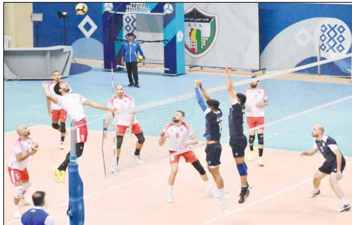
Kuwait Club player goes for spike as Yarmouk defends.

In the championship, teams earning a 3-0 or 3-1 win receive the full three points, while losers earn none. A 3-2 win awards two points to the victor and one point to the defeated team. The tournament follows a single-round league format, with the top four teams advancing to the semi-finals. The first-place team faces the fourth, and the second takes on the third, with the winners moving on to the final match.