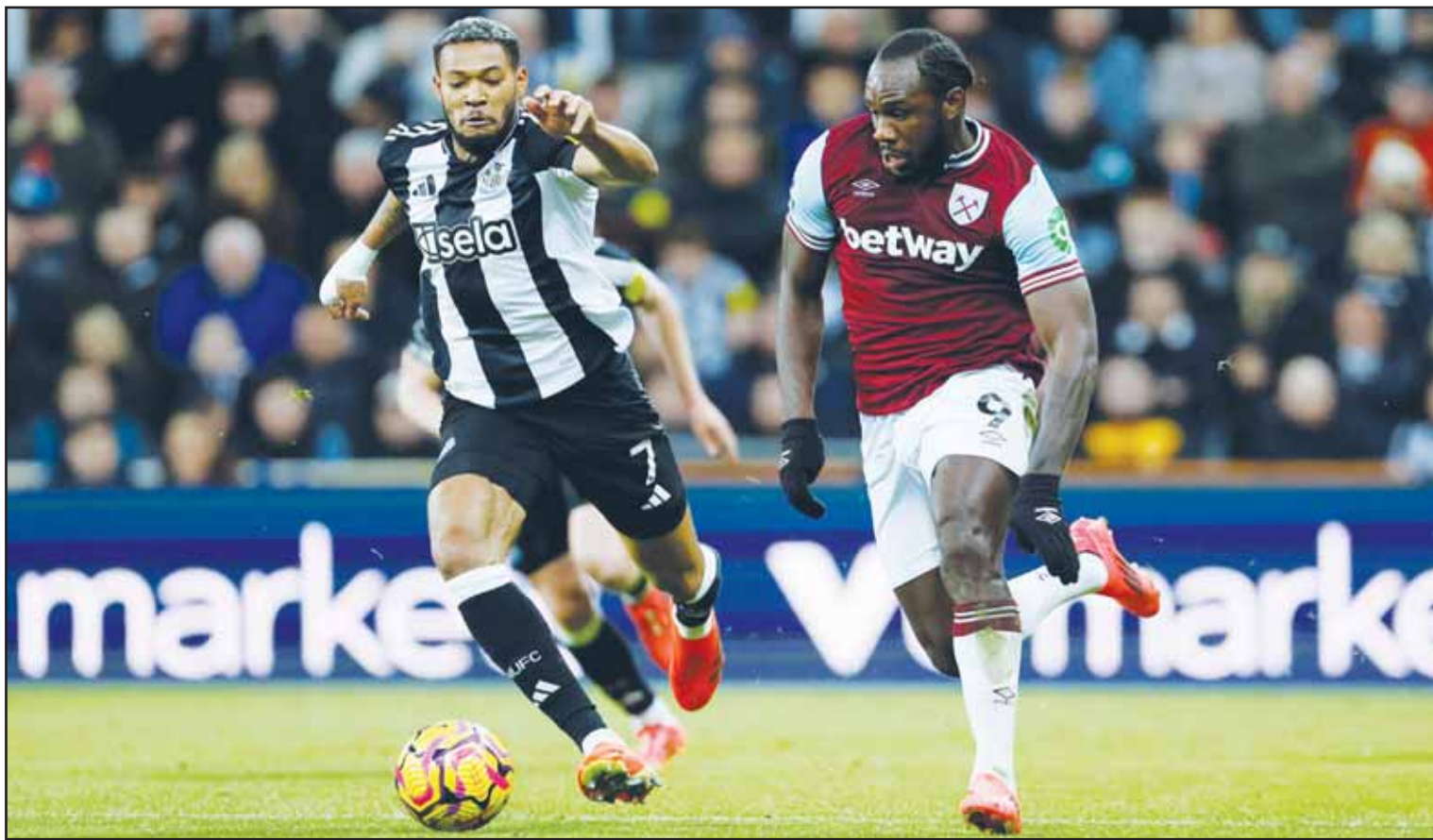
West Ham United's Michail Antonio, right, and Newcastle United's Joelinton, left, challenge for the ball during the English Premier League soccer match between Newcastle United and West Ham United in Newcastle, England.

Meanwhile, Tottenham goalkeeper Guglielmo Vicario says he played for an hour against Manchester City with a fractured right ankle that has since required surgery.