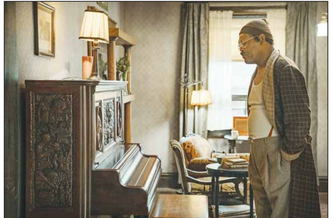
This image released by Netflix shows Samuel L. Jackson in a scene from 'The Piano Lesson.'