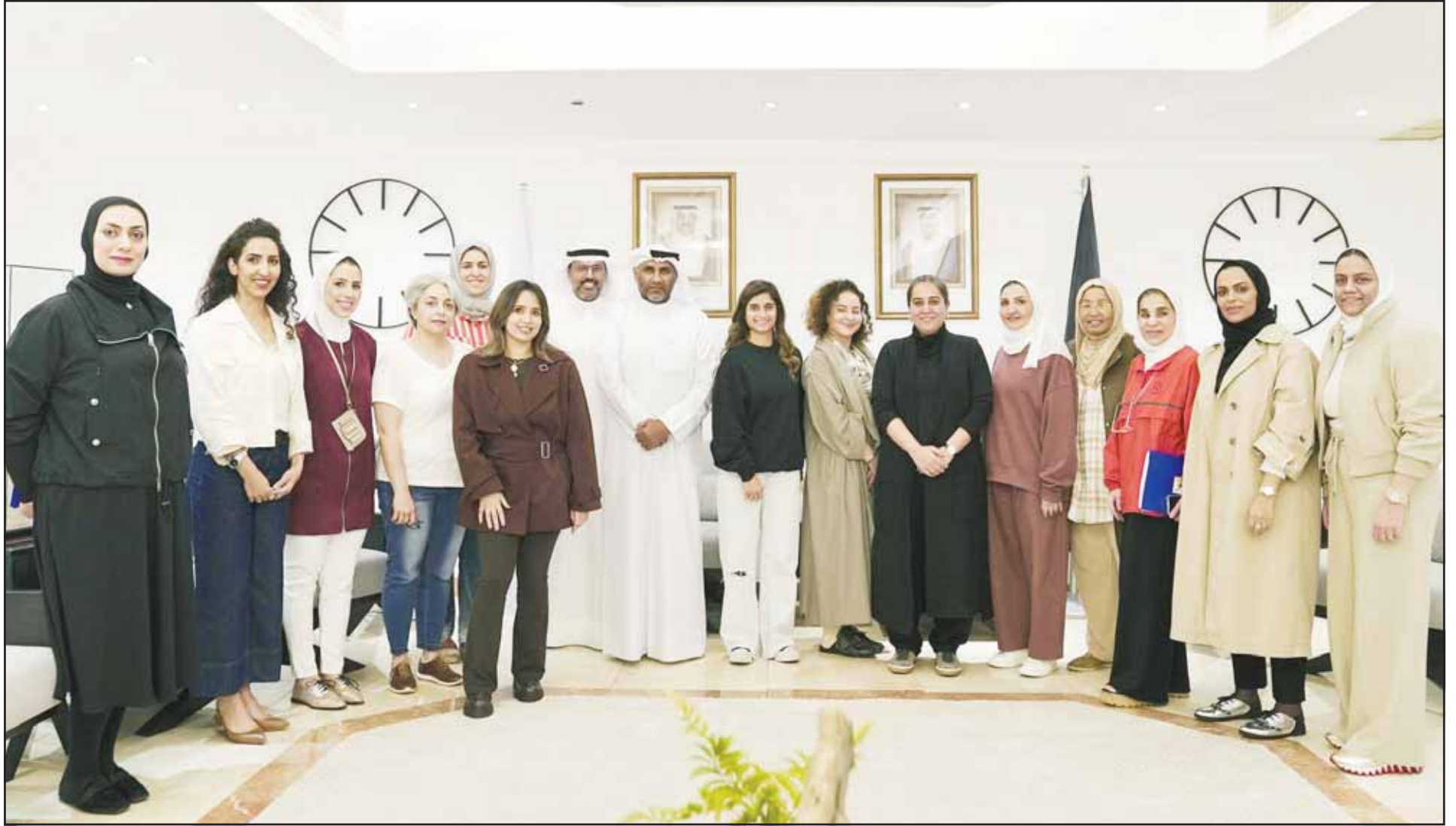
Members pose for a group photo after the meeting.