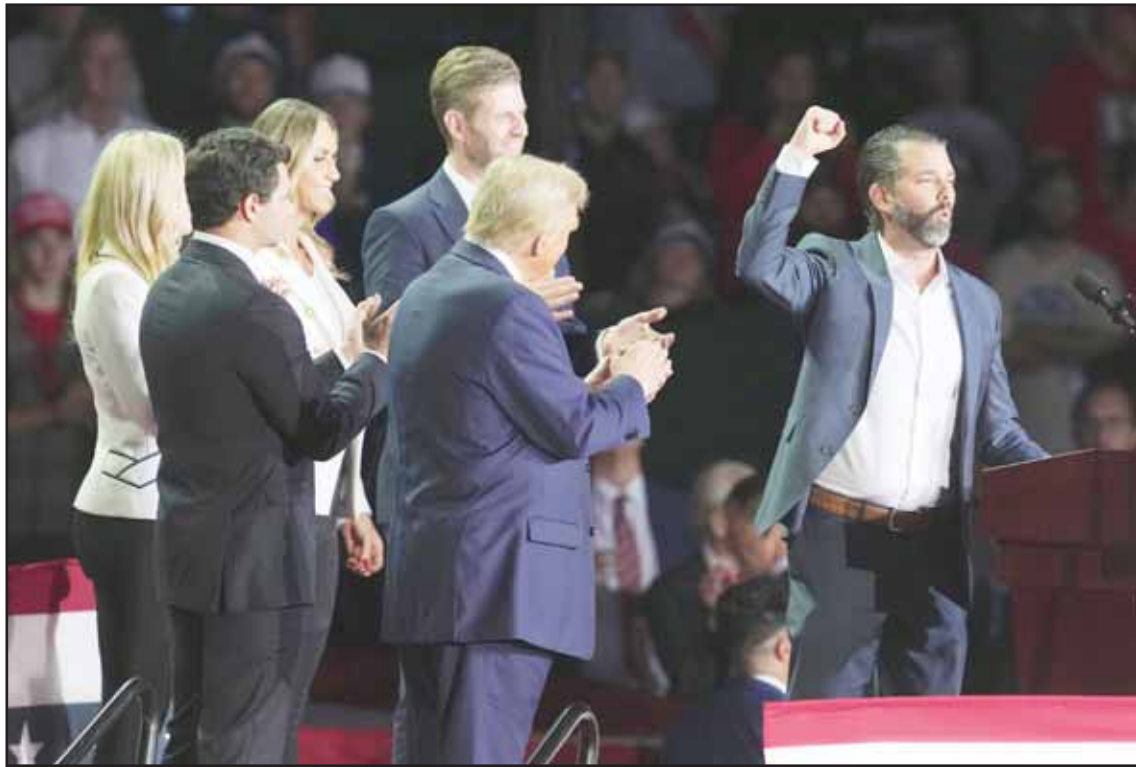
Michael Boulos and his wife Tiffany Trump, Lara Trump, Eric Trump and Republican presidential nominee former President Donald Trump listen as Donald Trump Jr., speaks at a campaign rally at Van Andel Arena on Nov 5 in Grand Rapids, Mich.