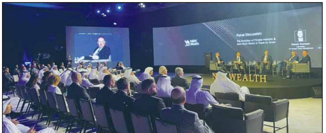
One of the panel discussions during the conference.