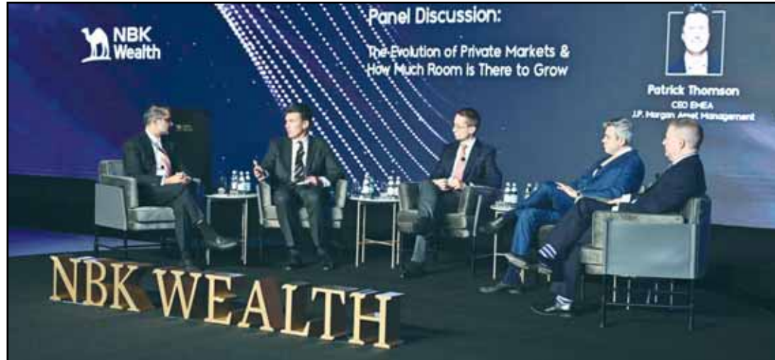
A discussion panel on the sidelines of the conference.