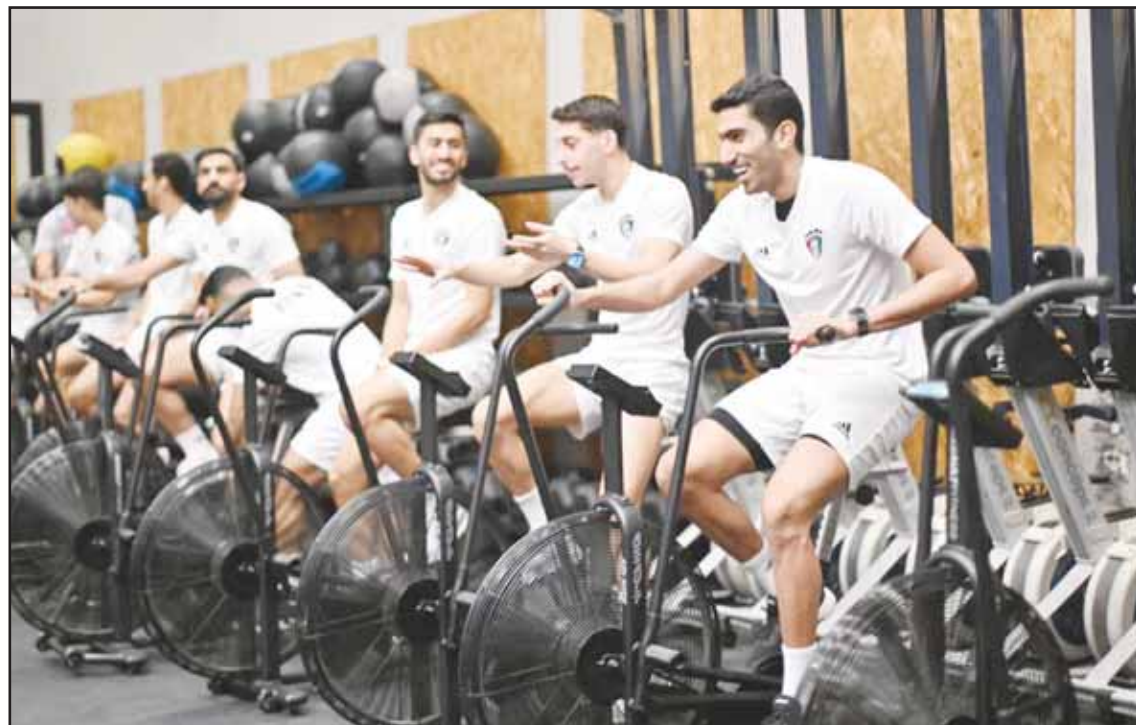
Kuwaiti players work out in the gym.

They are expected to join the national team on December 5, after their club duties conclude.