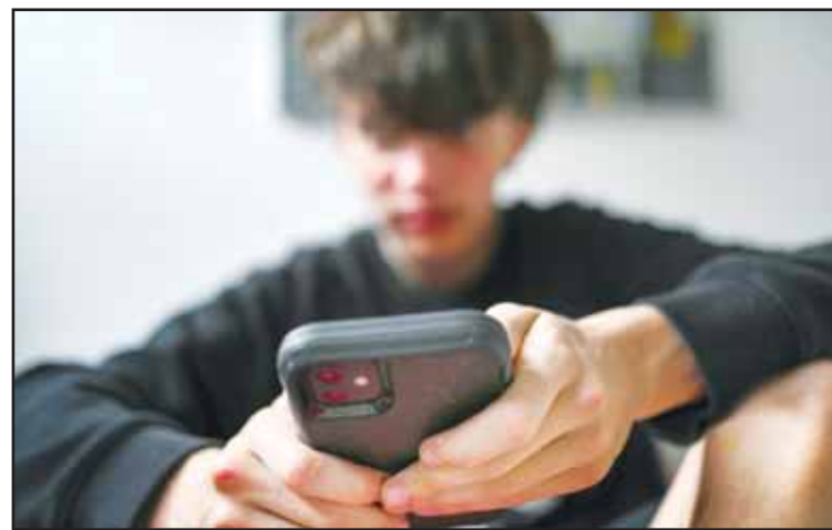
A teenager uses his mobile phone to access social media, Sydney, Wednesday, Nov. 13, 2024. (AP)

Conservative treatment of knee pain includes anti-inflammatory and pain medications and physical therapy. (AP)