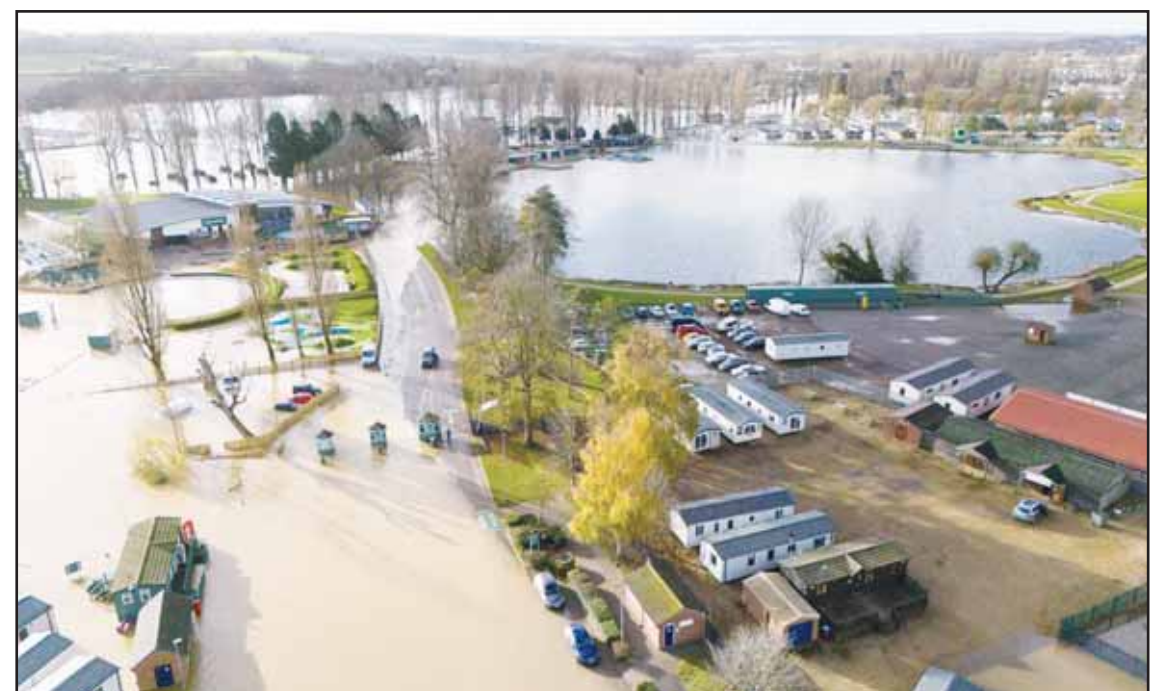
Floodwater covers parts of the Billing Aquadrome in Northamptonshire, England on Nov 25, after Storm Bert caused 'devastating' flooding over the weekend.