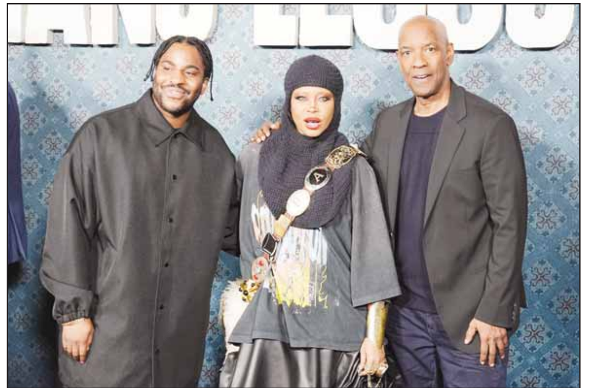
Denzel Washington, (right), producer of 'The Piano Lesson,' poses with cast member Erykah Badu, (center), and his son Malcolm, the film's director and co-writer, at the premiere of the film on Tuesday, Nov. 19, at The Egyptian Theatre in Los Angeles.