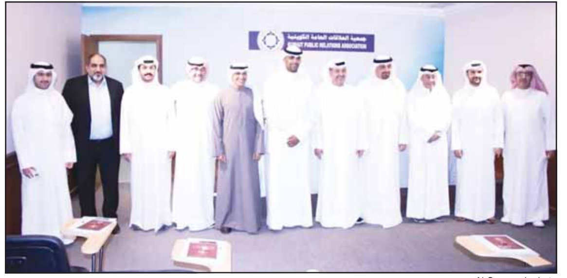
The new board of directors

Work on operating the lighting network for remaining roads in other suburbs, including N5 and N12, is ongoing, with cooperation from the Ministry of Electricity and Water to ensure the completion of services for the public.