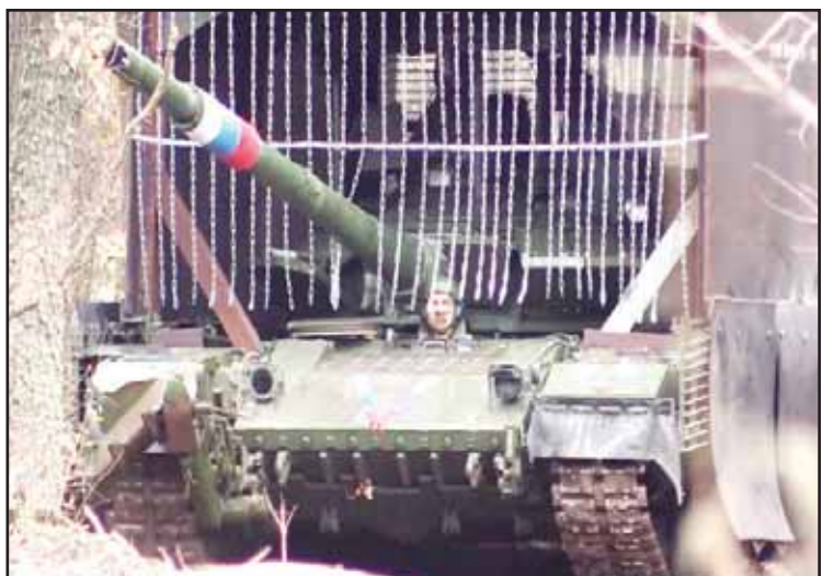
In this photo taken from video released by the Russian Defense Ministry Press Service on Nov 26, a Russian T-80 tank rolls in Donetsk region in Ukraine.

Ukrainian defenses in Donetsk are not in danger of being overrun, however, the think tank said. It also noted that Russia would need to capture more than 8,000 square kilometers (3,000 square miles) of territory to achieve the Kremlin's goal of seizing the whole of Donetsk.