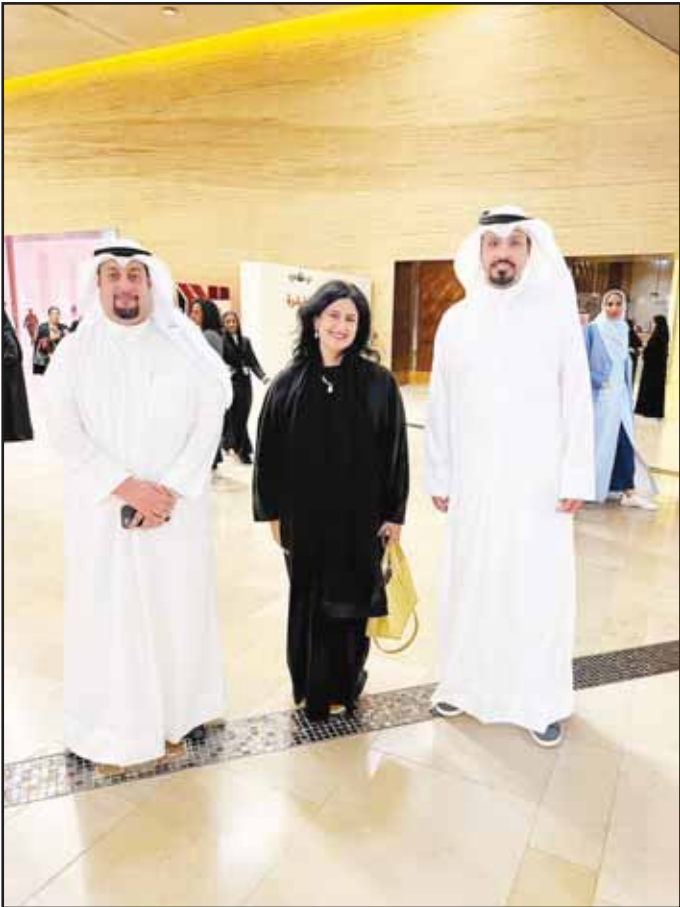
The Kuwaiti delegation, headed by Sheikha Al-Anoud Al-Sabah.