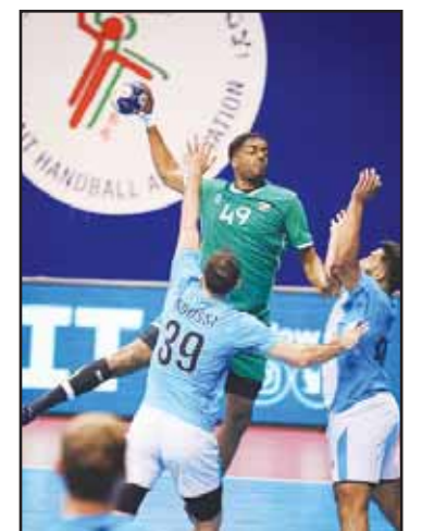
Al-Arabi attacks Salmiya defense.

Burqan's performance continues to showcase its strength as a contender for the top positions, while Khaitan climbed to ninth place with 6 points. Al-Qurain, despite