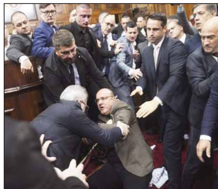
Ruling party lawmakers, opposition members, and some ministers fight during Serbia's parliament session, which was scheduled to debate the 2025 budget, in Belgrade, Serbia on Nov 25.

The rail station, a major hub, was recently renovated as part of a Serbian-Chinese partnership. Critics allege that corruption, poor oversight and inadequate construction work contributed to the tragedy.