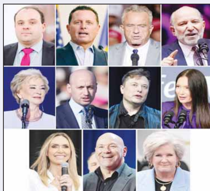
This combination photo of US President-elect Donald Trump's longtime friends, aides and allies shows Boris Epshteyn, from top row left, Richard Grenell, Robert F. Kennedy Jr., Howard Lutnick, from center row left, Linda McMahon, Stephen Miller, Elon Musk, Brooke Rollins and from bottom row left Lara Trump, Dana White and Susie Wiles.

During the 2022 midterms, some in Trump's orbit also represented candidates seeking his endorsement, leading to accusations that aides were profiting off their proximity to the former president.