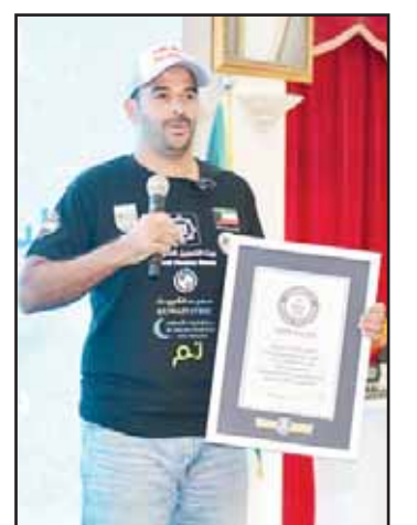
Kuwait's world-famous jet ski champion Mohammad Burbayea.