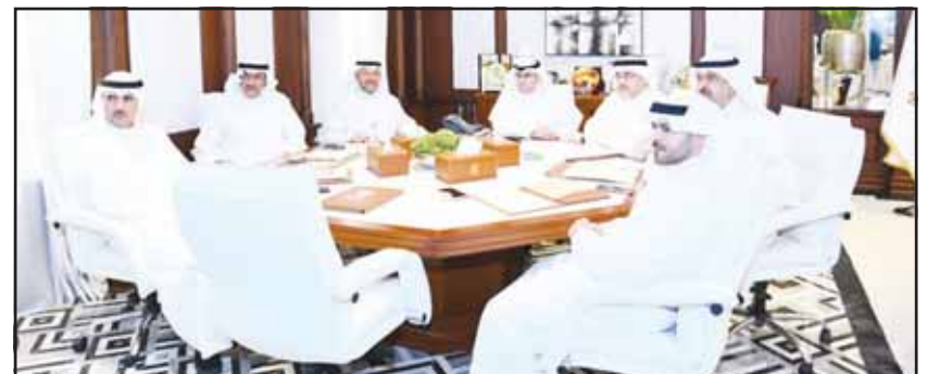
The six governors during their meeting with State Minister of Municipal Affairs and Minister of State for Housing Welfare Abdullah Al-Mishari.