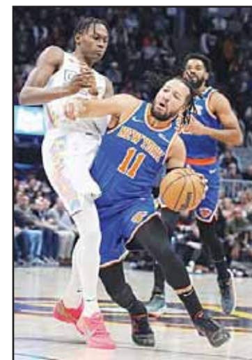
New York Knicks guard Jalen Brunson, right, drives the lane past Denver Nuggets forward Peyton Watson in the first half of an NBA basketball game in Denver.

Jaden Hardy had a season-high 23 points in his first start of the season for