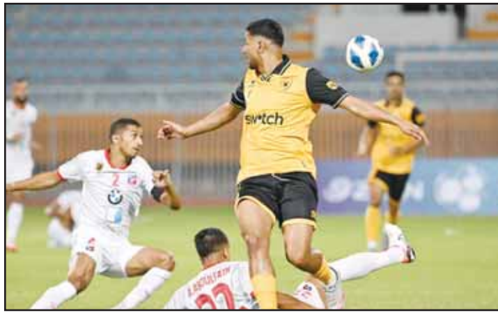
Al-Qadsiya and Kuwait Club looking for their first away wins.

Currently, Al-Qadsiya sits in third place with one point, trailing Al-Riffa in second with three points. Al-Ettifaq leads the group with six