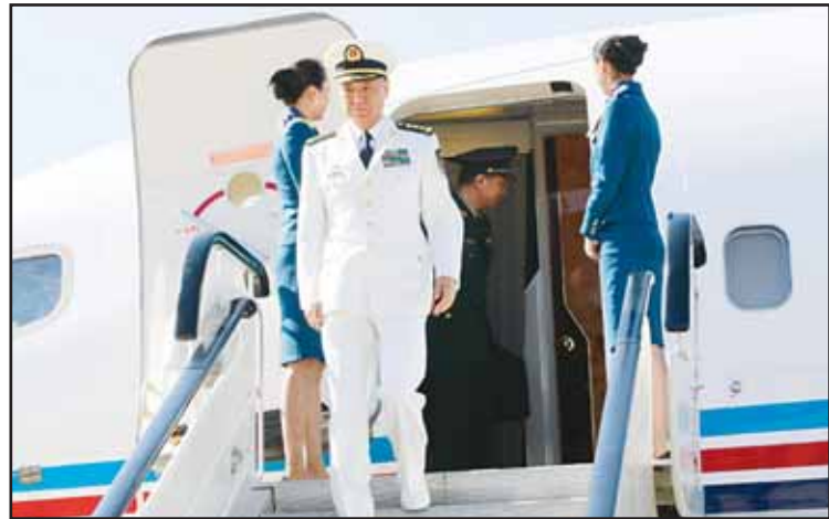
Miao Hua, China's director of the political affairs department of the Central Military Commission arrives at the Pyongyang Airport in Pyongyang, North Korea on Oct 14, 2019.