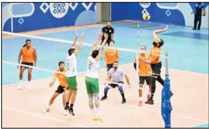
Kazma player goes for a spike as opponents defend.

The championship follows a single-round league format, with the top four teams advancing to the semi-finals. The first-placed team will face the fourth, while the second will meet the third, with the winners progressing to the final match.