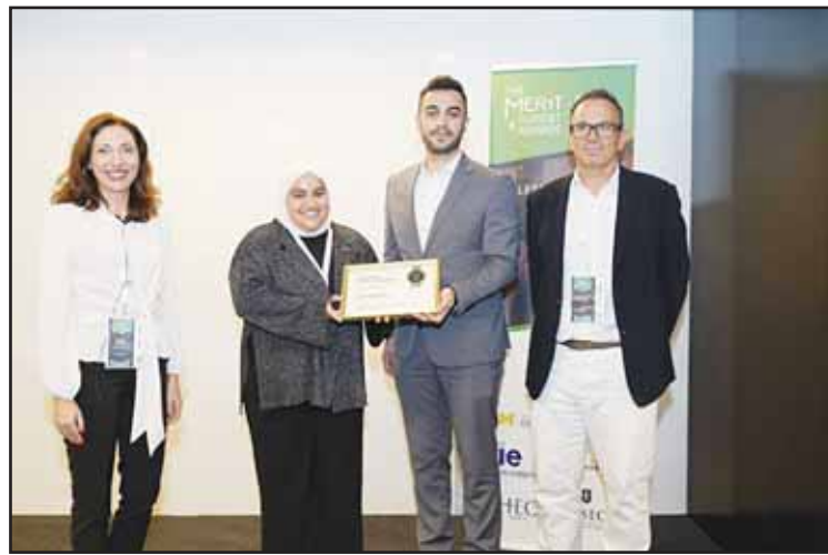
Official receives Merit Award.

Zain's IDEU program was designed to provide an immersive, interactive, and engaging learning experience that aligns with the demands of contemporary digital landscape. It serves as a route for 2,000