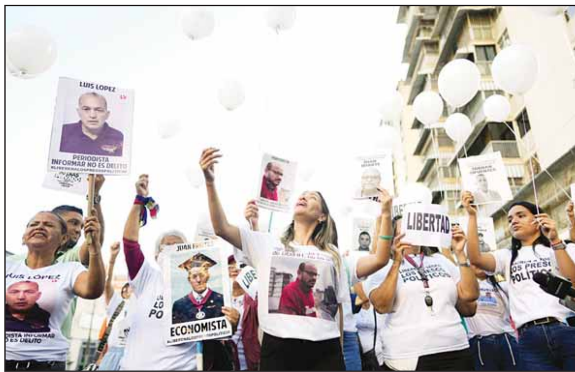
Relatives of detainees release balloons during a vigil calling for the freedom of political prisoners near the headquarters of the National Intelligence Service (SEBIN) in Caracas, Venezuela on Nov 27.