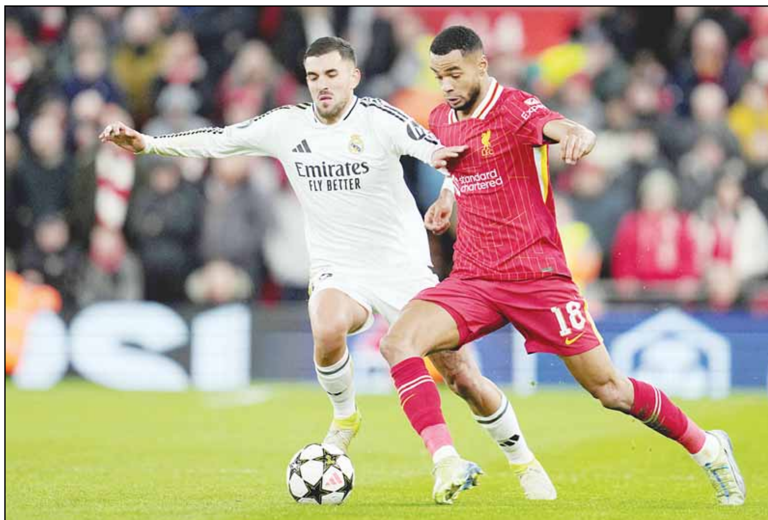
Liverpool's Cody Gakpo vies for the ball with Real Madrid's Dani Ceballos, left, during the Champions League opening phase soccer match between Liverpool and Real Madrid at Anfield Stadium, Liverpool, England.

Liverpool's stand-in right back Bradley was a standout Wednesday,