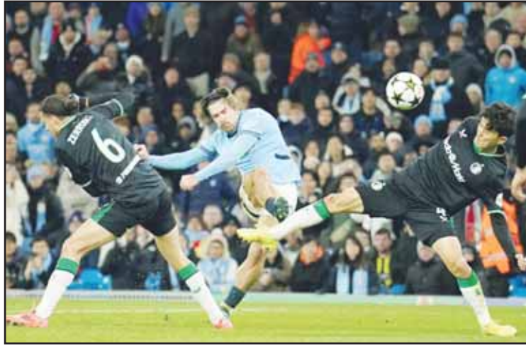
Manchester City's Jack Grealish, center, hits the bar with a shot during the Champions League opening phase soccer match between Manchester City and Feyenoord at the Etihad Stadium in Manchester, England.

City is clearly missing season-long absentee Rodri, the Ballon d'Or winner and the holding midfielder who is so important in conducting their attacking play and protecting the defense. Mateo