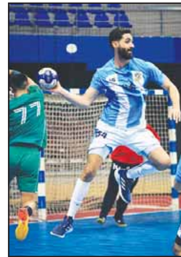
Al-Salmiya looking to return to winning ways.

Meanwhile, Kuwait Club will face Al-Nasr tomorrow in a match postponed from the ninth round. Matches involving Kuwait Club and Kazma had been rescheduled due to their participation in the recently concluded Asian Championship in Doha.