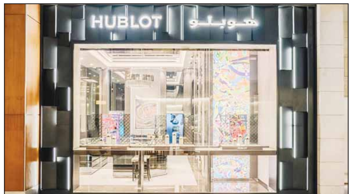
Hublot's new boutique at 360 Mall.

Follow our Facebook Page for more updates https://www.facebook.com/mensvoicekuwait/