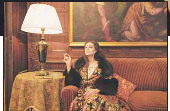
This image released by Netflix shows Angelina Jolie as Maria Callas in a scene from 'Maria.'

LOS ANGELES, Nov 28, Angelina Jolie glides through the final days of Maria Callas' short life in Pablo Larraín's "Maria," a dramatic, evocative elegy to the famed soprano. It's an affair that's at turns melancholy, biting and grandly theatrical, an aria for a once in a generation star.