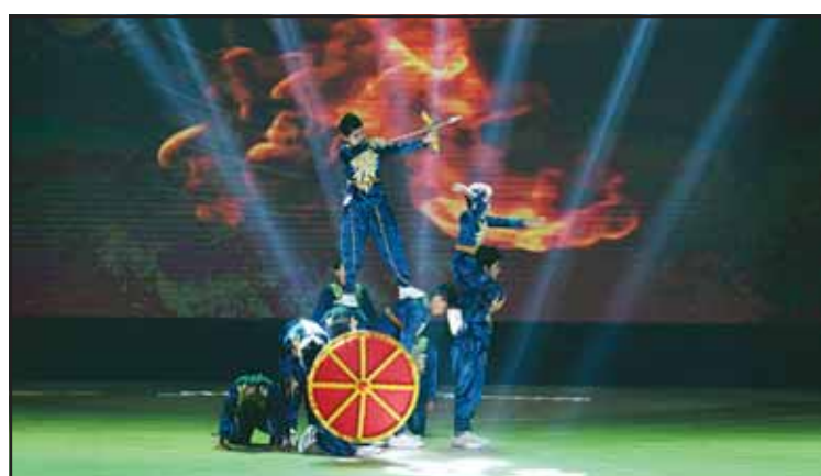
Top & above: Photos during the Annual Day celebrations for Grade 4.