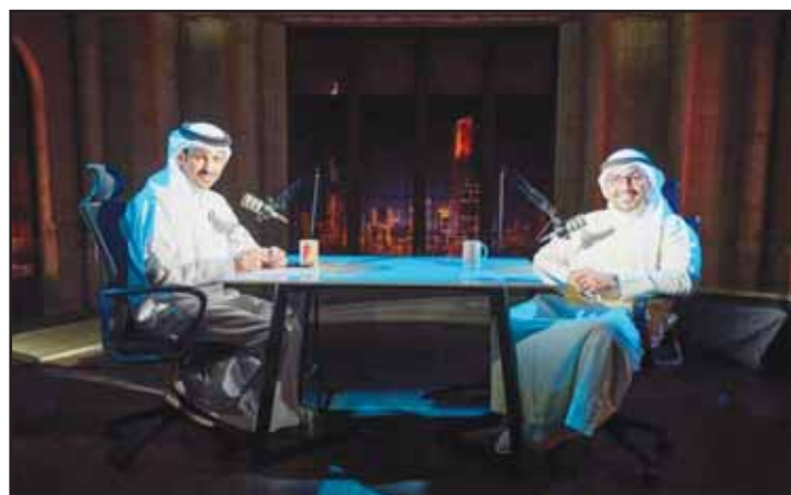
Part of the interview.