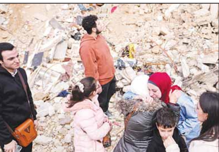
Displaced residents pause and hug as they stand in front of the rubble of their destroyed house in Baalbek, eastern Lebanon, Thursday, Nov. 28, 2024.

KUWAIT CITY, Nov 28, (Agencies): The Kuwaiti Ministry of Foreign Affairs on Thursday welcomed the ceasefire in Lebanon, which took effect in the early hours of Wednesday, hoping that it would culminate in a permanent ceasefire and an end to the anguish of the Lebanese people.