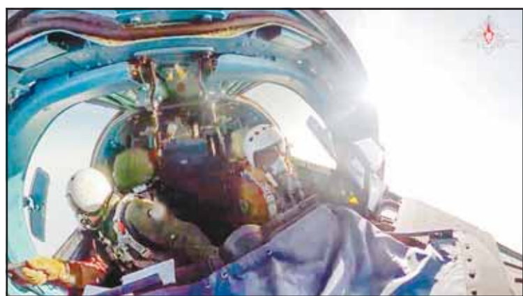
In this photo taken from video released by the Russian Defense Ministry on Nov 28, pilots of an Su-34 bomber of the Russian air force fly at an undisclosed location in Ukraine.