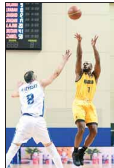
Al-Qadsiya player shoots over Yarmouk player during the basketball league match.