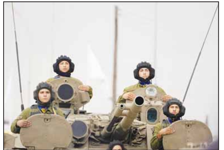
Cyprus' soldiers on a military vehicle pass during a military parade marking the 63th anniversary of Cyprus' independence from British colonial rule, in divided capital Nicosia, Cyprus, on Oct 1 2023.

Through September, the United States has imported $378.9 billion in goods from Mexico, $322.2 billion from China and $309.3 billion from Canada.