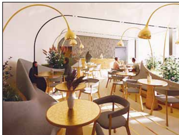
College of Architecture – Kuwait University