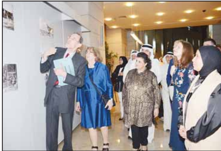
The grandchildren of the Dicksons revisit cherished Kuwaiti history.

played in the yard, where men rode horses and spent hours under the tent in the desert chatting over endless cups of coffee. Women covered themselves up in swathes of cloth under a relentless sun. The images slowly give way to coloured pictures of more recent times showing an oil-producing country moving towards development and modernity. It is a fascinating kaleidoscope of snapshots taken from the early 1900s and ending with the 1970s.