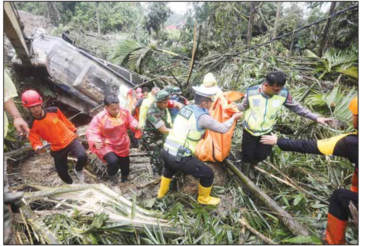
Rescuers remove the body of a victim from the wreckage of a vehicle after it was hit by a landslide that killed multiple people in Deli Serdang, North Sumatra, Indonesia, on Nov 28.

She added that the La Nina phenomenon is expected to persist until April 2025.