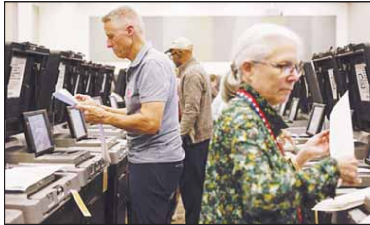
Volunteers feed ballots into ballot machines as Mecklenburg officials hold a recount in North Carolina's Supreme Court election on Nov 21 at Valerie C. Woodard Community Resource Center in Charlotte, NC.