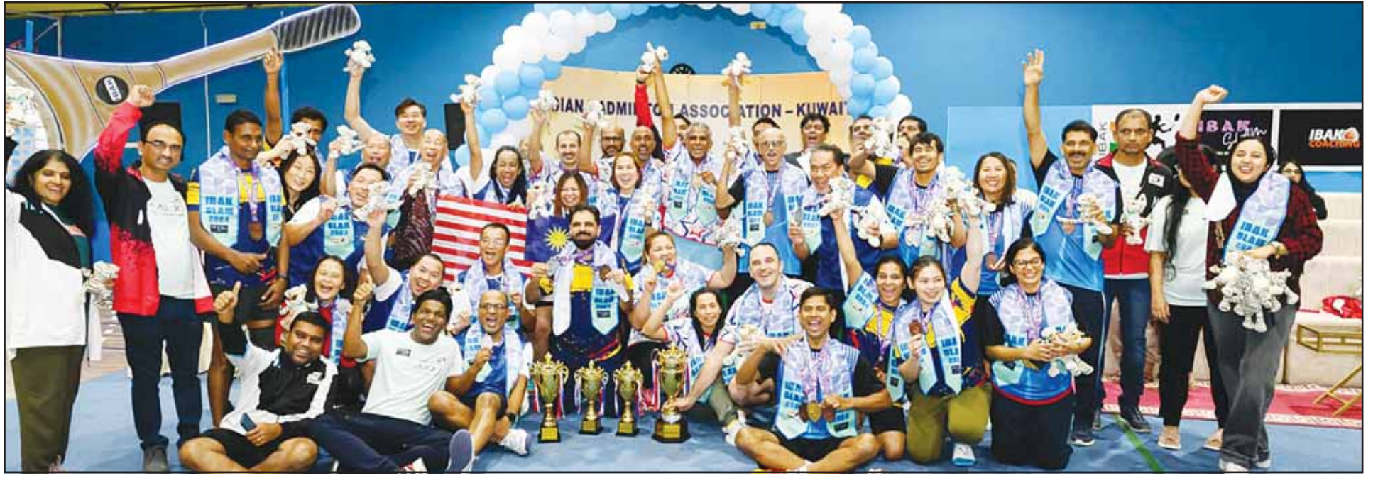
Group photo of winners.

Players from diverse countries, including India, Canada, Malaysia, Korea, Indonesia and more, participated in the tournament, showcasing their expertise and determination.