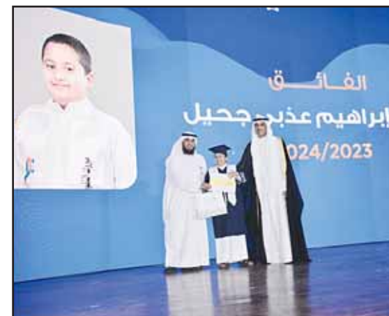
Top and above: Some of the honored outstanding children.