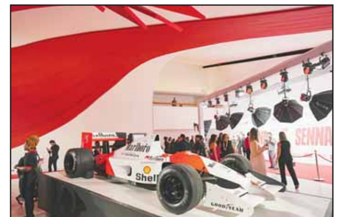
A replica of Formula 1 legend Ayrton Senna's car sits on display on the red carpet for the Netflix series Senna, about the life and death of Formula 1 legend Ayrton Senna, who was killed in a 1994 crash, in Sao Paulo, Tuesday, Nov. 26.