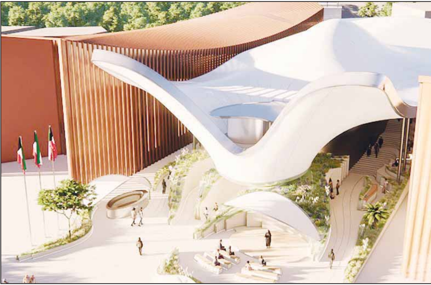
Kuwait pavilion at the Osaka 2025 Expo.