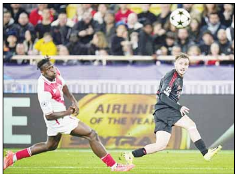
Benfica's Kerem Akturkoglu, right, and Monaco's Wilfried Singo vie for the ball during a Champions League opening phase soccer match at the Louis II stadium in Monaco.

Sturm Graz won 1-0 against Girona, the Spanish newcomer to European competitions. It was the Austrian champion's first Champions League game since coach Christian Ilzer left to join Hoffenheim.