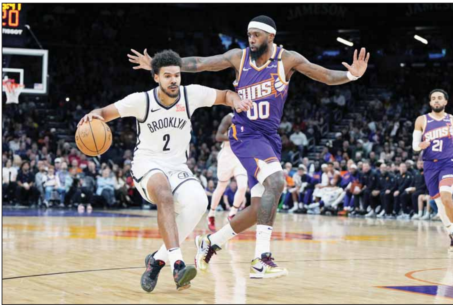
Brooklyn Nets forward Cameron Johnson shields the ball from Phoenix Suns forward Royce O'Neale (00) during the first half of an NBA basketball game in Phoenix.