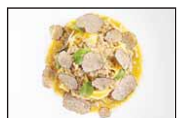
Dai Forni's seasonal truffle-infused menu

first of two starters: Burrata y Tartufo Bianco with a sautéed peach syrup and sourdough. In Zuppa Di Funghi e Tartufo Nero, whipped black truffle cream and fresh truffle snow enhances a fragrant mixed mushroom soup. Mains include wood-fired Pizza al Tartufo Nero, combining ricotta black truffle sauce and shaved fresh truffle with mozzarella fior di latte and foie gras mousse. Richly comforting Papardelle al Ragù di Agnello e Tartufo