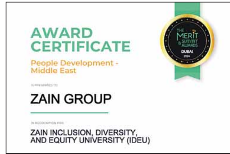
Zain Group MERIT Award.