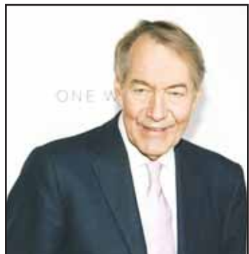
Charlie Rose attends The Hollywood Reporter's 35 Most Powerful People in Media party in New York, April 13, 2017.

"It is essential that these women know I hear them and I deeply apologize for my inappropriate behavior," Rose said. "I am greatly embarrassed. I have behaved in-