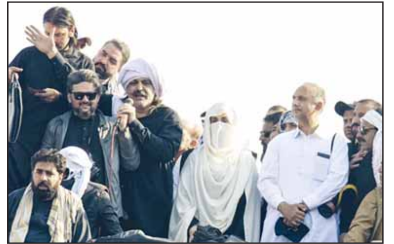
Bushra Bibi, (center), wife of imprisoned former premier Imran Khan and leaders of Khan's party lead their supporters during a rally demanding Khan's release, in Islamabad, Pakistan on Nov 26.