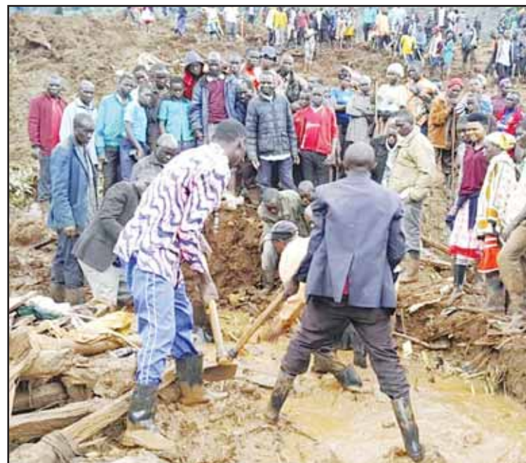
Rescue workers and people search for bodies after landslides following heavy rains buried 40 homes in the mountainous district of Bulambuli, eastern Uganda on Nov 28.

The prime minister's office issued a disaster alert on Wednesday stating that heavy rains across the country had cut off major roads.