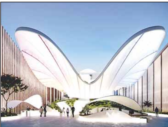
Kuwait pavilion at the Osaka 2025 Expo.