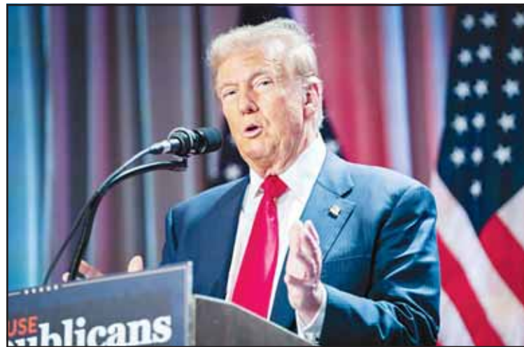
US President-elect Donald Trump speaks during a meeting with the House GOP conference on Nov 13 in Washington.

The exchange between the two leaders appeared to confirm for Trump the value of threatening to disrupt trade with import taxes. His initial social media post moved financial markets and gave him a response he was quick to describe as a win. Even if the proposed tariffs fail to materialize, Trump can tell supporters that the mere possi-