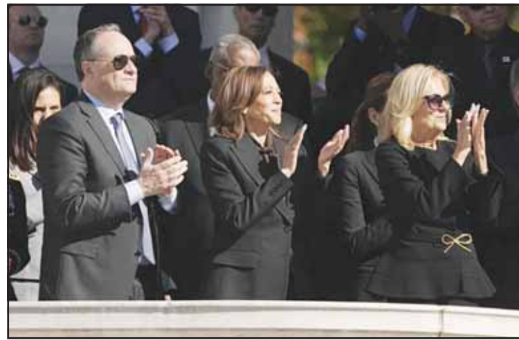
US second gentleman Doug Emhoff, (from left), Vice President Kamala Harris and First Lady Jill Biden attend the National Veterans Day Observance at the Memorial Amphitheater at Arlington National Cemetery in Arlington, Va. on Nov 11.

The pointed reflections on Harris' loss came just before she declared she was "proud of the campaign we ran" during a conference call with supporters as the party begins a painful