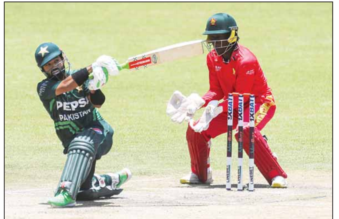
Pakistan's Mohammad Rizwan plays a shot during the third ODI cricket match between Zimbabwe and Pakistan at Queens Sports Club in Bulawayo, Zimbabwe.

Pakistan has spent millions of dollars on the upgrade of three stadiums in Karachi, Lahore and Rawalpindi - the three venues chosen for the Champions Trophy. Naqvi said he hoped the renovation of three stadiums will be completed well in time to host the event.