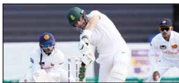
South Africa's Aiden Markam, centre, plays a shot as Sri Lanka's wicketkeeper Kusal Mendis watches on during the second day of the first Test cricket match between South Africa and Sri Lanka, at Kingsmead stadium in Durban, South Africa.