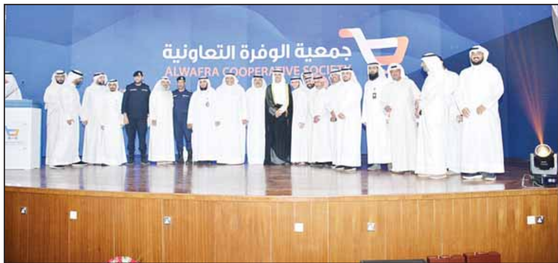
Ahmadi Governorate photos

Ahmadi Governor Sheikh Hamoud Jaber in a group photo during the celebration.