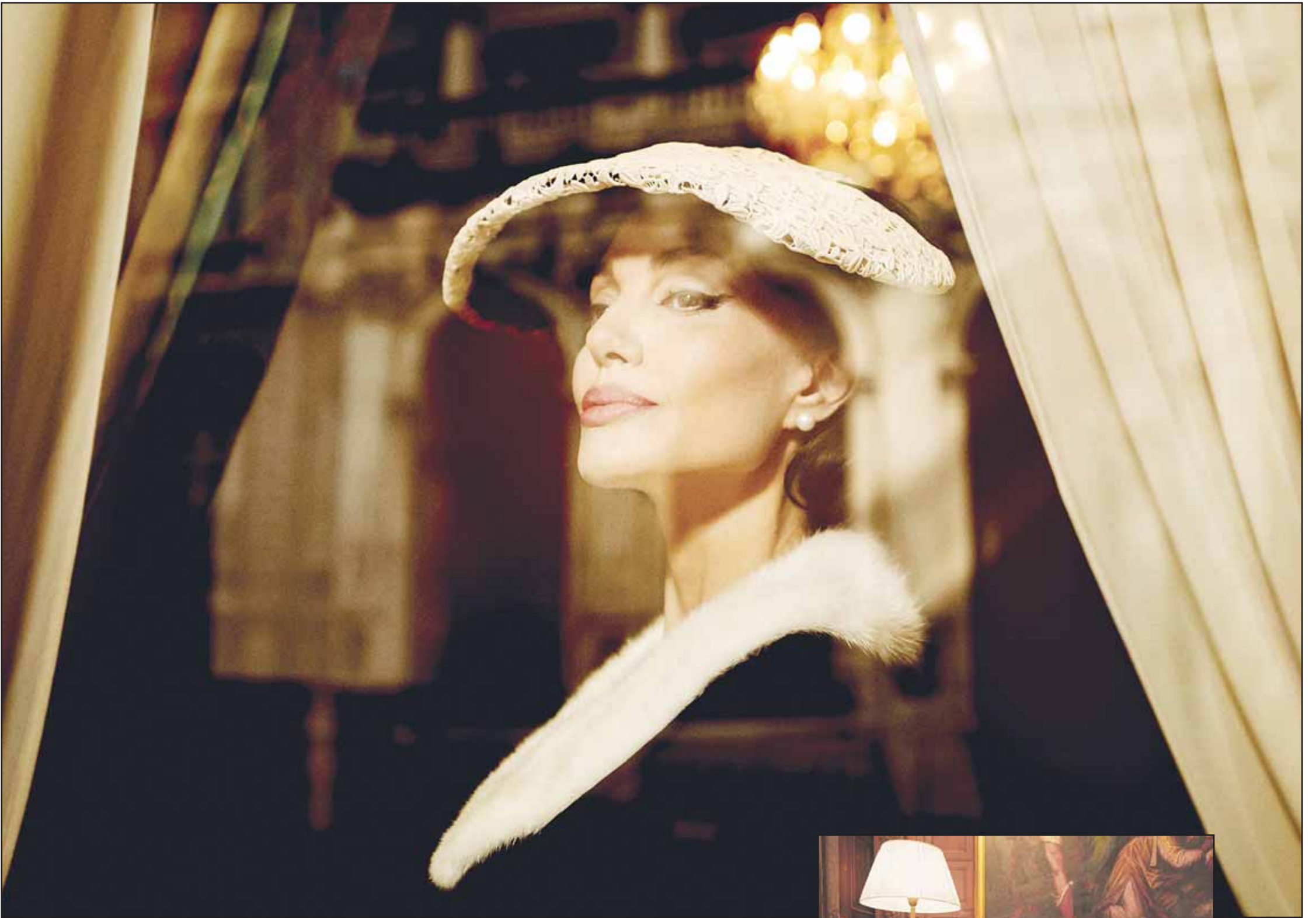
This image released by Netflix shows Angelina Jolie as Maria Callas in a scene from 'Maria.'