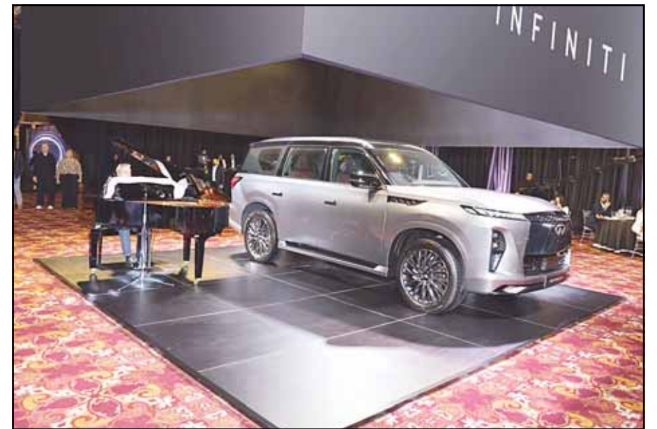
The all-new Infiniti QX80 at the new showroom.

This growth in credit facilities came as loans to all economic sectors saw significant increases, including housing loans. By the end of October 2024, housing loans reached 16.44 billion dinars, marking a 2.66 percent increase, or 427 million dinars, from 16 billion dinars at the end of 2023.