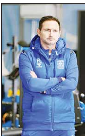
New Coventry City manager Frank Lampard.

As interim at Chelsea he managed one win in 11 games, losing eight of them.