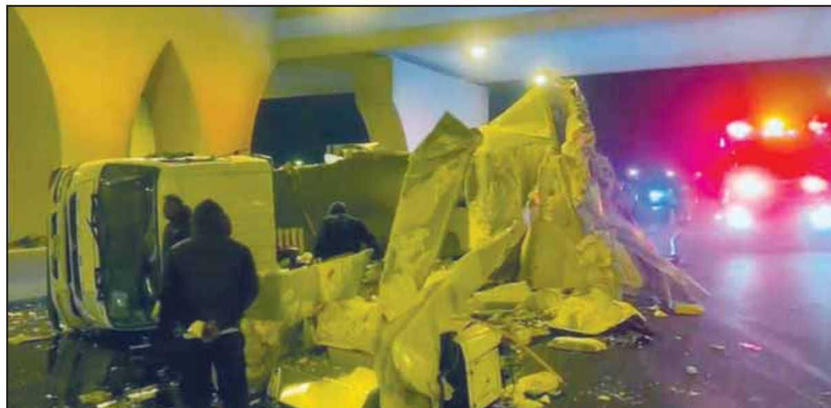
A truck carrying an oil load overturned. No casualties reported.

The center's team consists of a group of consultant doctors specialized in sleep medicine, neurology, obesity, ear, nose, and throat, dentistry, and mental health.