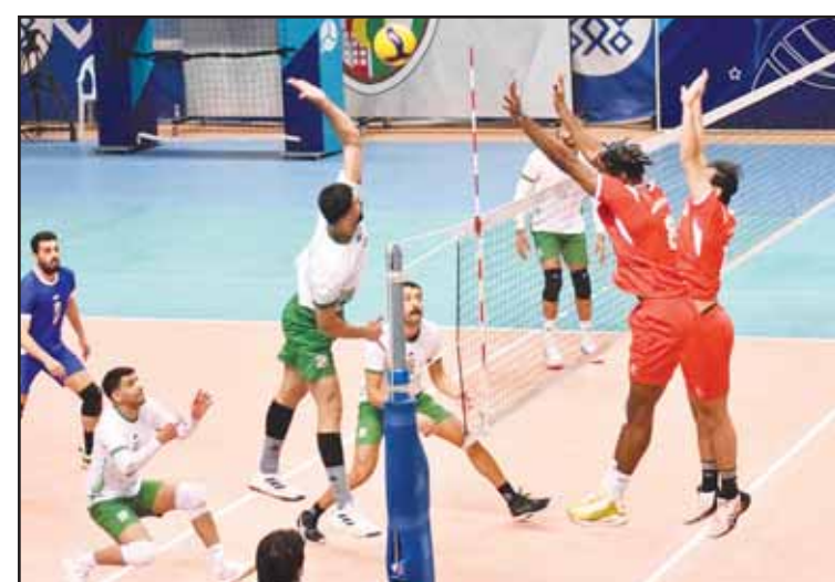
Al-Arabi and Al-Sulaiyikhat players in action.

In other results, Al-Arabi defeated Al-Sulaiyikhat 3-1 at the end of the sixth round, climbing to sixth place with 6 points, while Al-Sulaiyikhat remains in eighth with no points. Al-Yarmouk notched its first victory of the tournament with a 3-0 win over Al-Nasr.