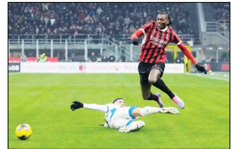
AC Milan's Rafael Leao, right, and Sassuolo's Cristian Volpato vie for the ball during an Italian Cup eighth final soccer match between AC Milan and Sassuolo at the San Siro stadium in Milan, Italy.

However, Orsolini limped off shortly after scoring and Bologna now faces an anxious wait to discover the extent of his injury. The Italy forward is Bologna's top goalscorer this season, with six goals.