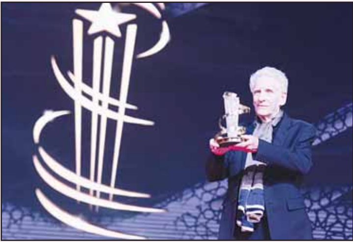
Canadian film director and screenwriter David Cronenberg receives an homage award during the Marrakech International Film Festival, in Morocco, Monday, Dec. 2, 2024.