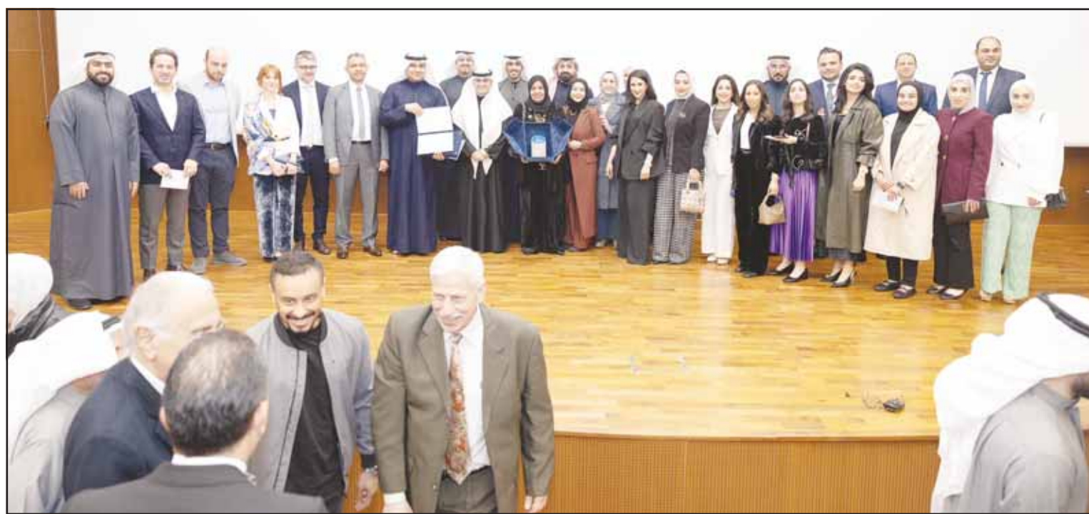
Maternity Hospital project staff honored by American Concrete Institute.