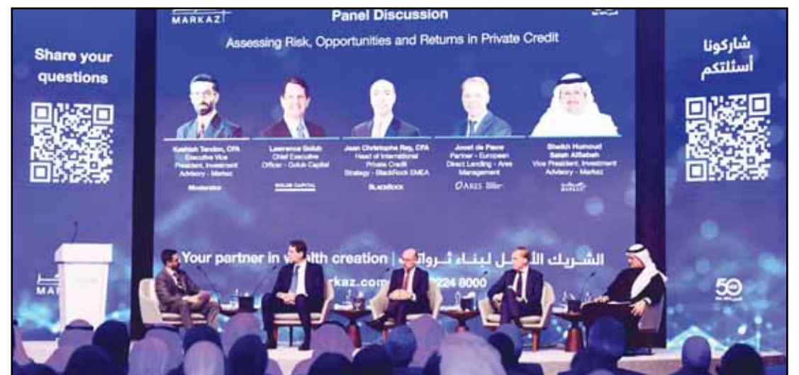
International industry experts from Golub, BlackRock, and Ares Management speaking on the panel discussing risks, opportunities and returns in private credit.