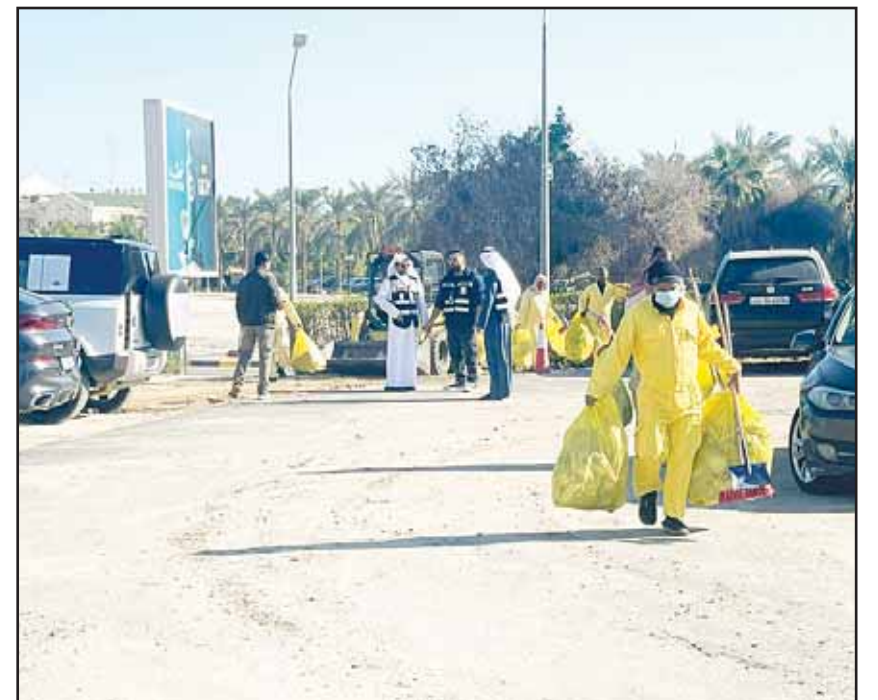
Cleaning campaign as part of Kuwait's preparations to host the Arabian Gulf Cup Football Championship.

Additionally, inspection teams will remove abandoned vehicles and trucks from the parking areas surrounding the training and match venues, while ensuring that mobile sales carts do not occupy unlicensed spots around the stadiums and parking lots, to maintain smooth traffic flow.