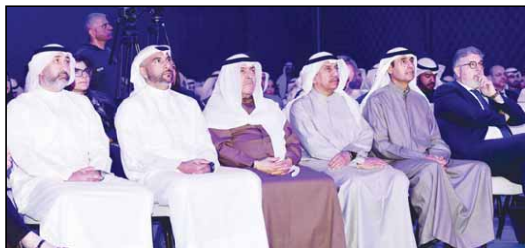
Markaz 2025 Outlook seminar attendees.

The seminar highlighted Markaz's pivotal role in supporting businesses by providing tailored financial solutions to help them build a foundation for sustainable growth. With a focus on key solutions essential for the investment journey, Markaz showcased offerings that are designed to address every stage of wealth creation. The event also reinforced Markaz's strategic direction for 2025, anchored in its 50-year legacy of trust, reliability, and expertise. The "Markaz Outlook for 2025" conference serves as a key platform for knowledge exchange within the financial community, fostering the sharing of expertise, insights, and anticipated opportunities. This reinforces Markaz's role as the partner in wealth creation.