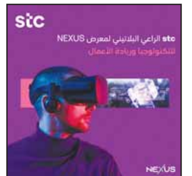
A flyer of the NEXUS event

The packages enable startup owners to select from a range of services, including fixed and mobile internet, network solutions, interactive screens, and surveillance cameras to meet the comprehensive security needs within the workplace. Solutions by stc will also be highlighting its advanced cloud-management solutions through Modar, a solution that addresses all business requirements through secure network connectivity. This platform aims to enhance the customer experience with IT solutions through a centralized management system using Modar, along with high-quality wireless communication services. During the event, the connectivity team from solutions by stc will host daily workshops to demonstrate and discuss Modar and Maktabi in addition to a sharing valuable insights on different solutions. Additionally, stc will be participating