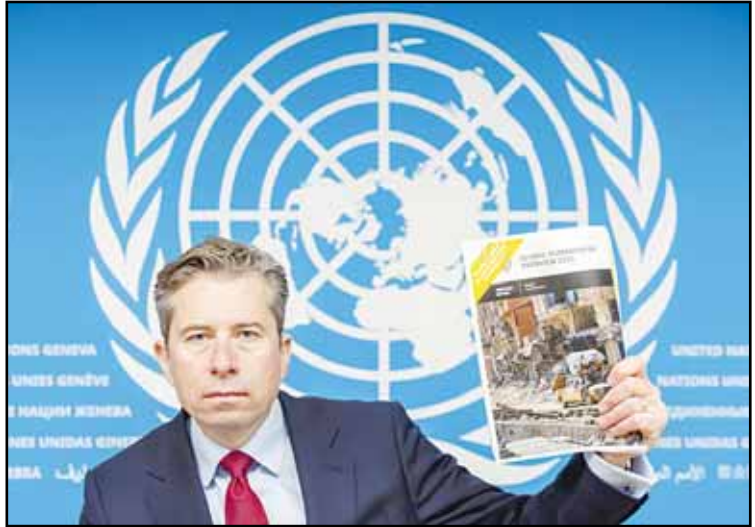
Tom Fletcher, under-secretary-general for Humanitarian Affairs and Emergency Relief Coordinator, attends a press conference at the European headquarters of the United Nations in Geneva, Switzerland on Dec 3.

Such funds go to U.N. agencies and more than 1,500 partner organizations. The biggest asks for 2025 are for Syria - a total of $8.7 billion for needs both within the country and for neighbors that have taken in Syrian refugees - as well as Sudan at a total of $6 billion, the "Occupied Palestinian Territory" at $4 billion, Ukraine at about $3.3 billion and Congo at nearly $3.2 billion.