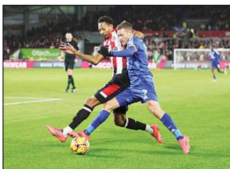
Brentford's Ethan Pinnock, left and Leicester City's Jamie Vardy vie for the ball, during the English Premier League soccer match between Brentford and Leicester City at the Gtech Community Stadium, in Brentford, England.