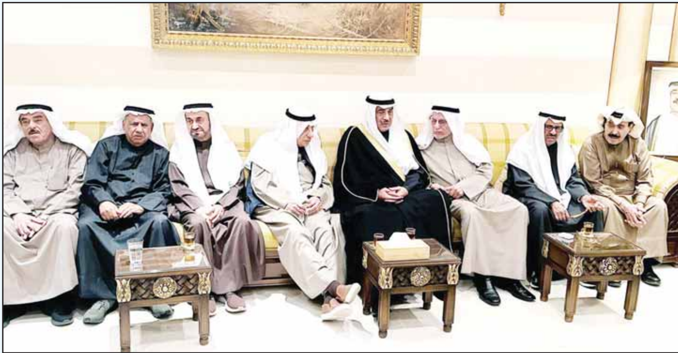
His Highness Crown Prince Sheikh Sabah Al-Khaled during his visit to the Al-Khalifa Diwan.

The informal meeting with His Highness the Crown Prince Sheikh Sabah Al-Khaled provided citizens with a unique opportunity to hear the leader's insights on various local, regional, and international political matters that capture the attention of the nation, especially in a world that