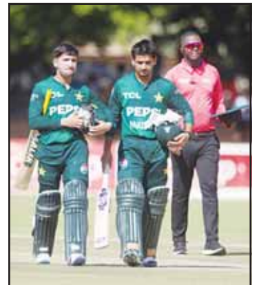
Pakistan's Saim Ayub and Omair Bin Yousuf during the second T20 cricket match between Zimbabwe and Pakistan at Queens Sports Club in Bulawayo, Zimbabwe.

Former all format captain Babar Azam, Mohammad Rizwan, Saim Ayub and Salman Ali Agha were