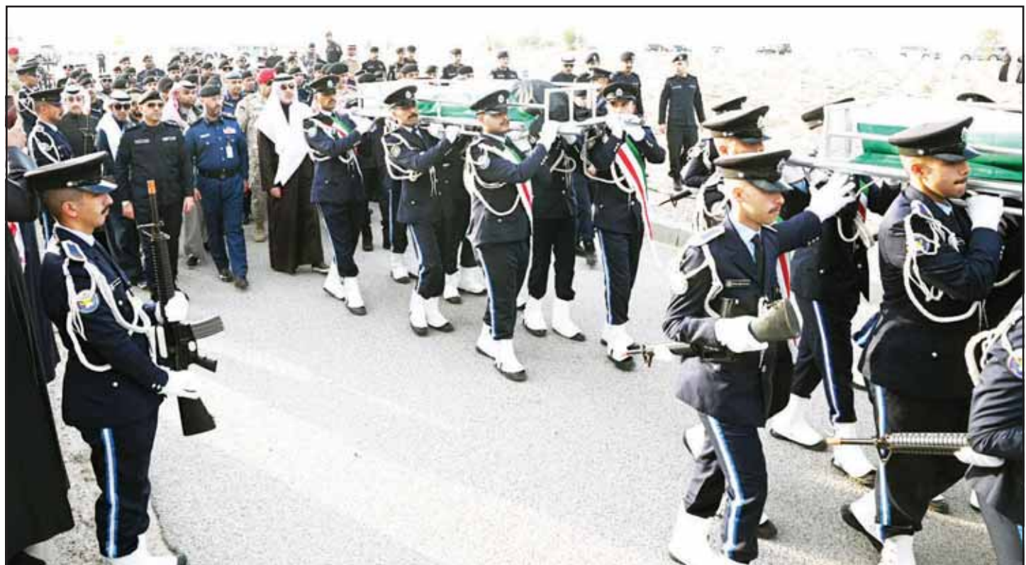
First Deputy Prime Minister, Minister of Defense, and Minister of Interior Sheikh Fahad Yusuf Saud Al-Sabah follows as the slain police officers are taken for their final journey.