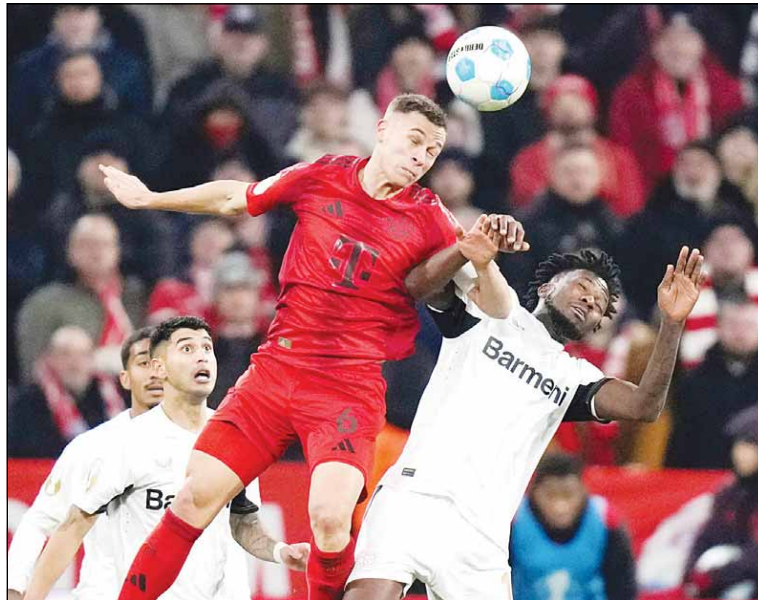
Bayern's Joshua Kimmich, left, fights for the ball with Leverkusen's Edmond Tapsoba during a German Cup Round of 16 soccer match between Bayern Munich and Bayer Leverkusen at the Allianz Arena in Munich, Germany.