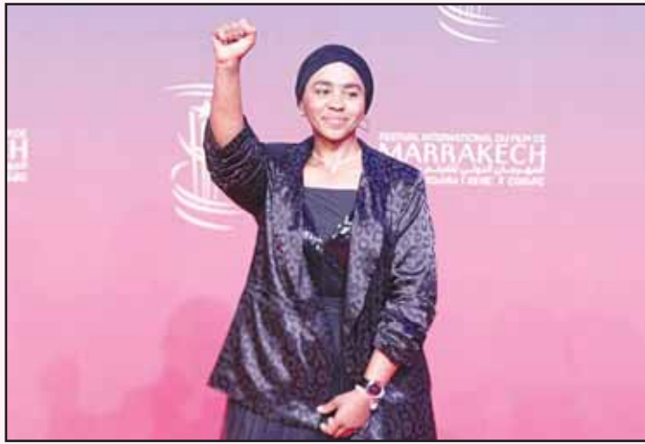
Sudanese actress Shajian Suliman gestures while attending the screening of Sudan Remember Us movie, during the Marrakech International Film Festival. (AP)