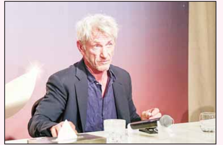
American actor and film director Sean Penn speaks to the press during a conference at the Marrakech International Film Festival, Morocco, Tuesday, Dec. 3.

'Oscars are limiting imagination and diversity'