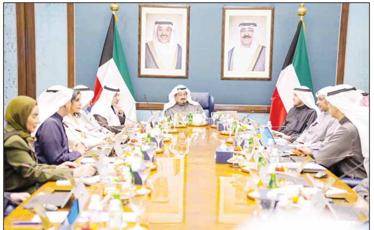
PM Diwan photo

The decision also noted that agencies with specialized functions will determine their holiday schedules based on directives from the relevant authorities, ensuring alignment with the public interest.