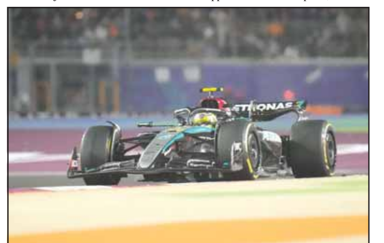
Mercedes driver Lewis Hamilton of Britain in action during the Qatar Formula One Grand Prix at the Lusail International Circuit in Lusail, Qatar.