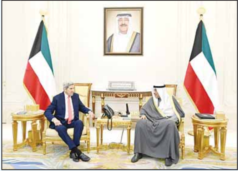
Crown Prince Diwan photo

Residency permits are necessary for those wishing to reside in Kuwait, and specific provisions allow Kuwaitis to sponsor non-Kuwaiti family members. Domestic workers' absences must be reported within two weeks, and their residency can be annulled if they leave the country for over four months without approval.