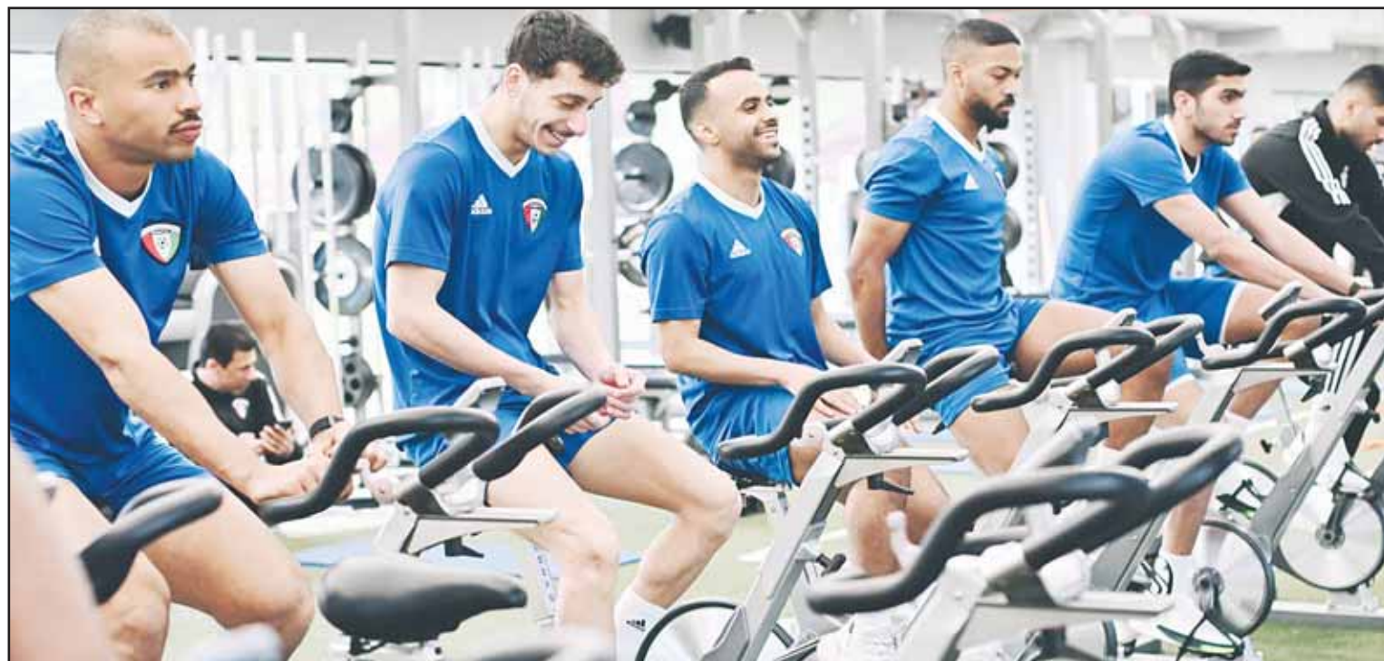
The Kuwaiti players intensify training in Doha.

DOHA, Dec 4: Players from Qadsia and Kuwait Club have joined the national football team delegation in Doha for their training camp ahead of "Khaleeji Zain 26", which Kuwait will host from December 21 to January 3.