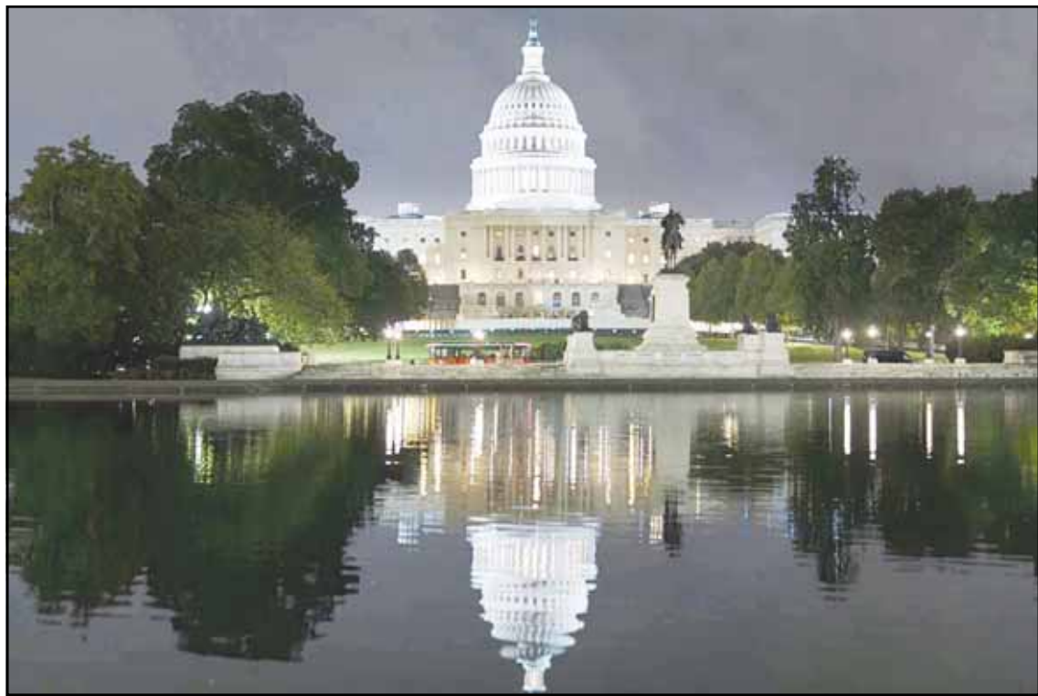
The Capitol is seen in the reflecting pool as lawmakers work into the evening in Washington on Sept 23.

party's far-left wing, which is often ignored by establishment Democrats who control the party's messaging, strategy and policy platform. Vermont Sen. Bernie Sanders irked some party leaders the day after the election with a scathing critique: "It should come as no great surprise that a Democratic Party which has abandoned working class people would find that the working class has abandoned them."