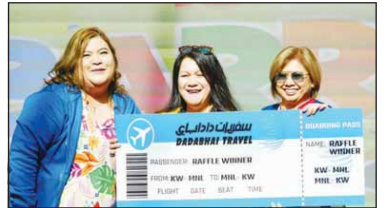
Dadabhai Travel General Manager hands the air ticket to the raffle draw winner.