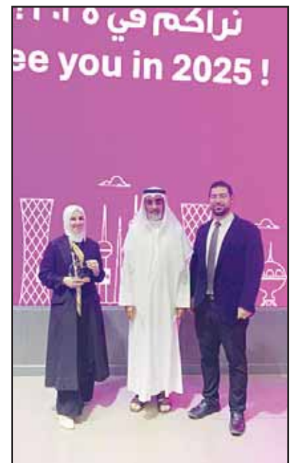
Photo from the event

The "Thesis in Three Minutes" competition challenges young researchers to present their theses in an innovative and concise manner in a competitive yet collaborative environment. It aims to highlight the outstanding research efforts of students in various disciplines and universities in the GCC.