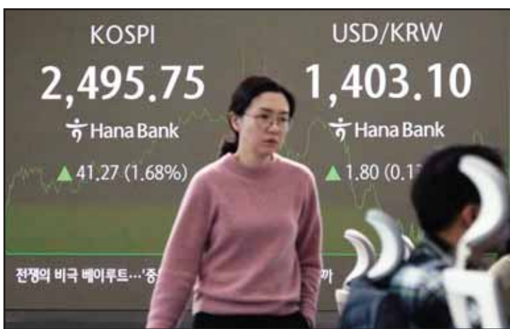
A currency trader passes by a screen showing the Korea Composite Stock Price Index (KOSPI), left, and the foreign exchange rate between U.S. dollar and South Korean won at the foreign exchange dealing room of the KEB Hana Bank headquarters in Seoul, South Korea, Tuesday, Dec. 3, 2024.

Elsewhere in the region, in a further step toward an outright trade war, China announced Tuesday it was banning exports to the United States of gallium, germanium, antimony, and other key high-tech materials with potential military applications. Beijing took the measure after the U.S. expanded its list of Chinese companies