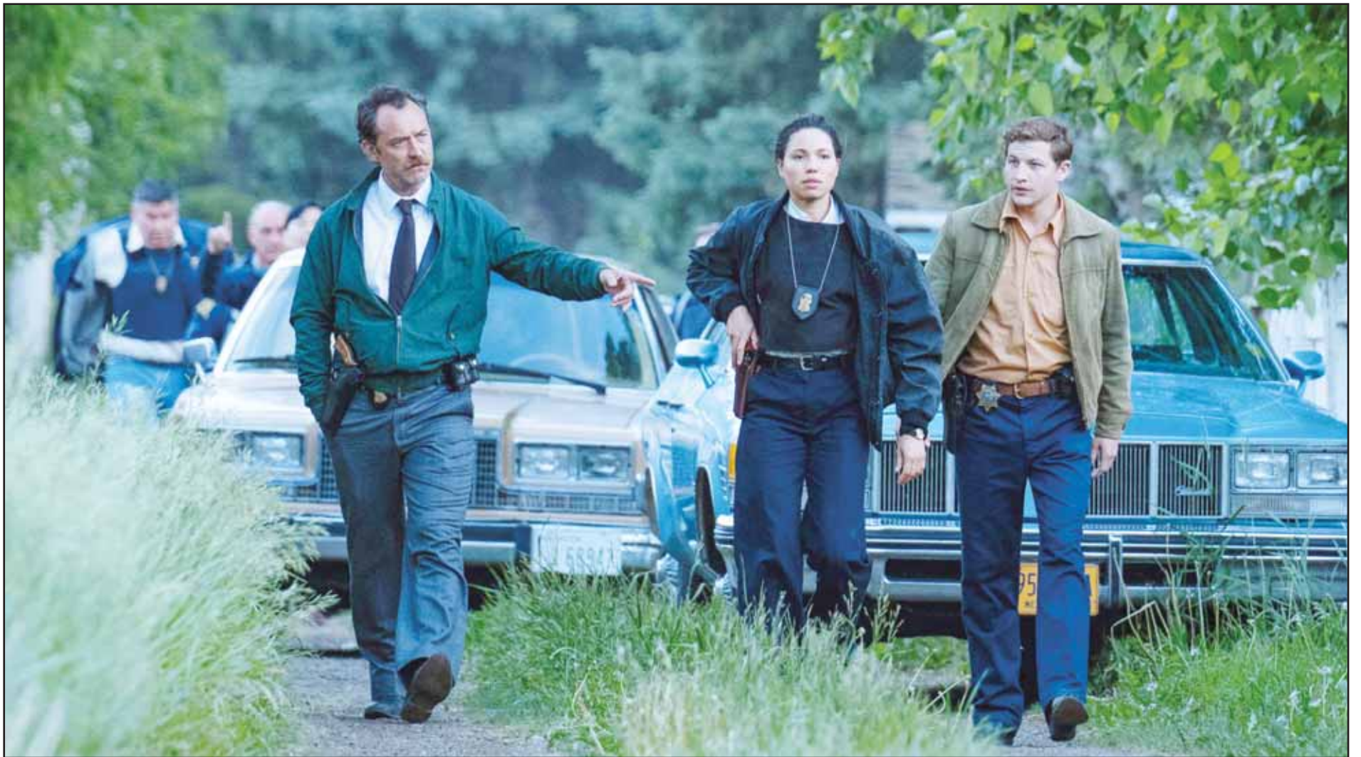
This image released by Vertical shows Jude Law, (from left), Jurnee Smollett and Tye Sheridan in a scene from 'The Order.'

But it has also been criticized for rewarding impenetrable conceptual work and often sparks debate about the value of modern art, with winners such as Hirst's "Mother and Child Divided," which consists of two cows, bisected and preserved in formaldehyde, and Martin Creed's "Lights On and Off" - a room with a light blinking on and off - drawing scorn from sections of the media.