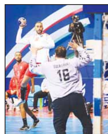
Kuwait Club makes a goal attempt against Al-Sulaiyikhat.

The round concludes today with two games at the Sheikh Saad Al-Abdullah Indoor Halls Complex. Al-Qadsia faces Al-Tadamon at 5:00 pm, followed