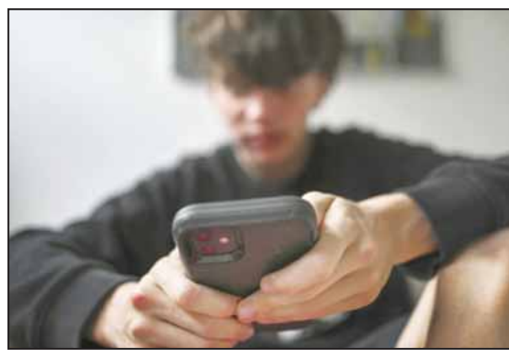
A teenager uses his mobile phone to access social media in Sydney, Nov 13, 2024.

The law will make platforms including TikTok, Facebook, Snapchat, Reddit, X and Instagram liable for fines