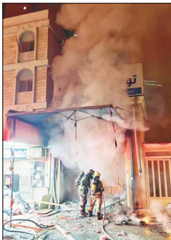
Firemen at the site of the laundry fire.

The statement read, "We pray that Allah Almighty grants them mercy, places them in His eternal gardens, and provides their families and loved ones with patience and comfort."