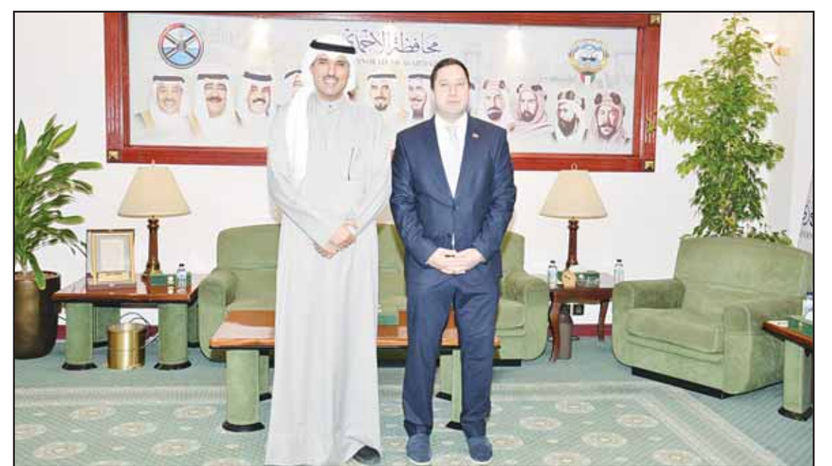
A moment during the meeting between Ahmadi Governor and Serbian Chargé d'Affaires.

He affirmed that Serbia and Kuwait share deep-rooted and strong ties.