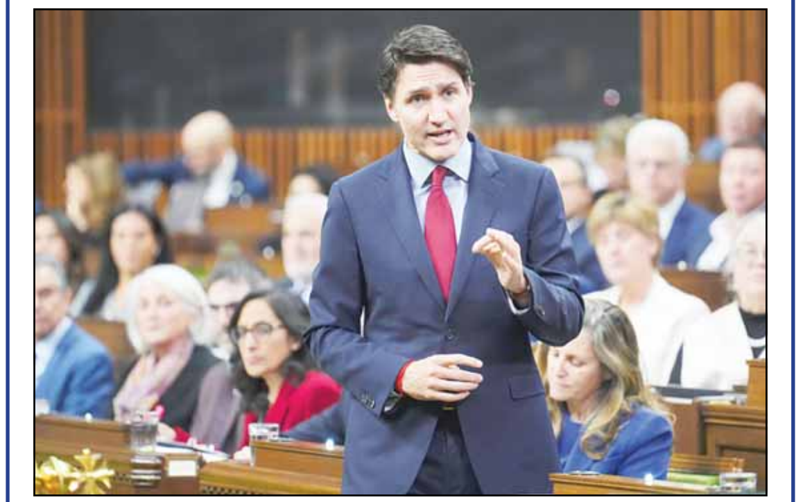
Canadian Prime Minister Justin Trudeau rises during question period in the House of Commons on Parliament Hill in Ottawa, Ontario, on Dec 3.

Trump's choice of Fox News anchor Pete Hegseth as defense secretary and hard-right FBI critic Kash Patel to lead the Federal Bureau of Investigation face potentially difficult confirmation hearings ahead. Hegseth, who met with senators late into Monday evening, was on Capitol Hill for a second day Tuesday.