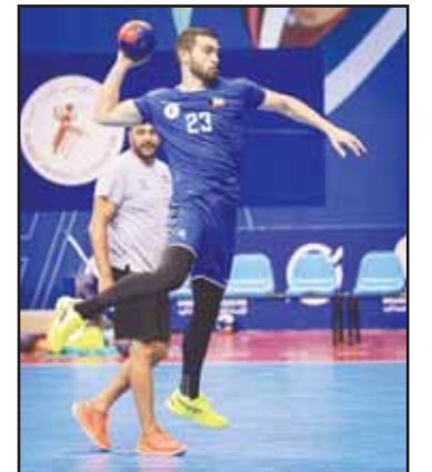
Kuwait completes its external camp in Tunisia.

He also emphasized that the technical staff, led by Hijazi, worked to