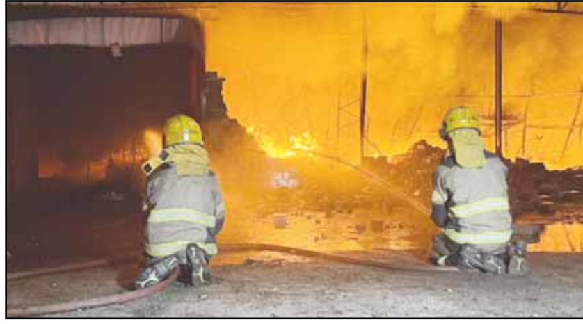
Fire-fighters spraying foam and water on the fire.

"— Compiled by PFX Fernanades / Mahmoud Attiyeh