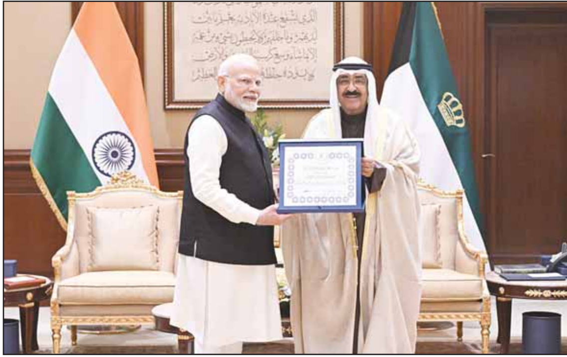
His Highness the Amir presents visiting Indian Prime Minister Narendra Modi with the prestigious Mubarak Al-Kabeer Order.