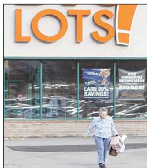
A shopper leaves the Big Lots store on Dec. 4, 2012 in Berlin, Vt.

At the end of 2023, Big Lots operated nearly 1,400 stores in 48 states. A more recent store count wasn't immediately available.