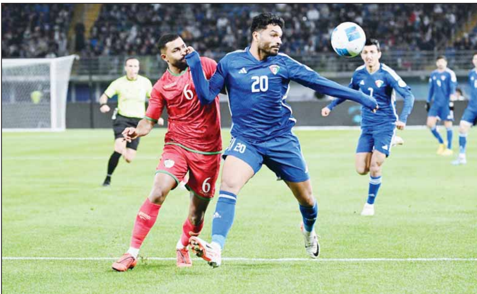
Kuwait and Oman players vie for the ball during the opening match of Khaleeji Zain 26.

UAE coach Paulo Bento felt his team deserved more than a 1-1 draw against Qatar. He noted that the level of the Qatari team was different from their previous encounters in the World Cup qualifiers, and praised their tactical philosophy. Bento acknowledged that his team could have won after dominating the match for extended periods but cited a defensive error leading to the Qatari goal. Despite the draw, Bento expressed satisfaction with the team's performance, especially as they gained control of the midfield in the second half. He also recognized that opening matches are always difficult, but was pleased with how his players performed overall.