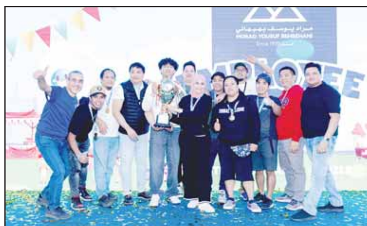
Top and above: photos from the event

Morad Yousuf Behbehani Group reiterated their commitment to hosting similar events annually, showcasing their steadfast appreciation for their people. This celebration is a testament to the Group's belief that its employees are its greatest asset, reinforcing its reputation as a company that places people at the core of its values and vision.