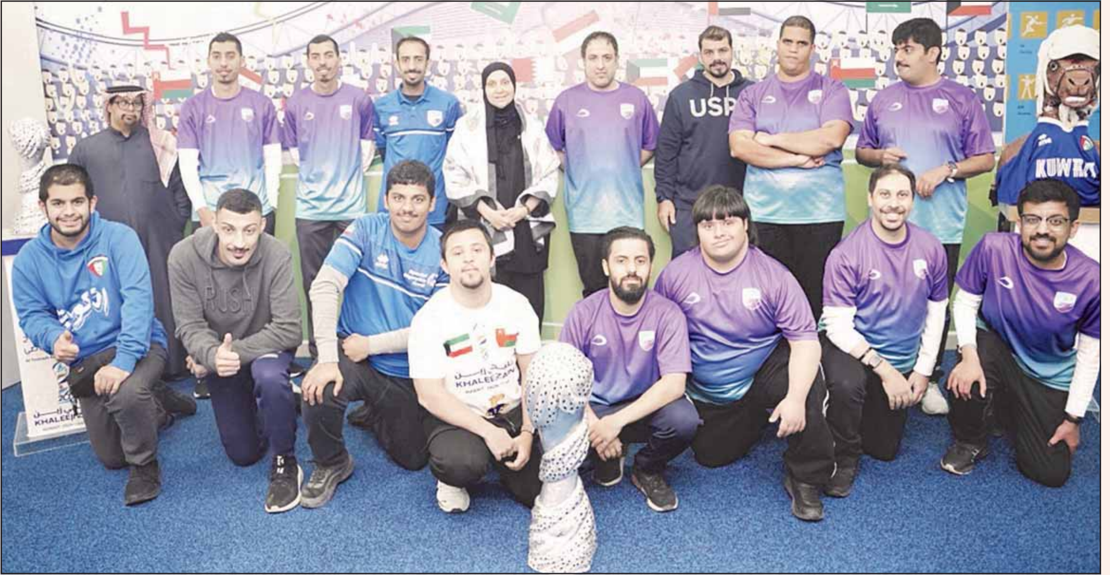
Tomooh Sports Club members pose for a group photo after the event.