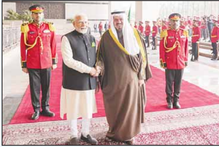
His Highness the Prime Minister Sheikh Ahmad Abdullah Al-Ahmad Al-Sabah receives the Indian counterpart Prime Minister Narendra Modi.