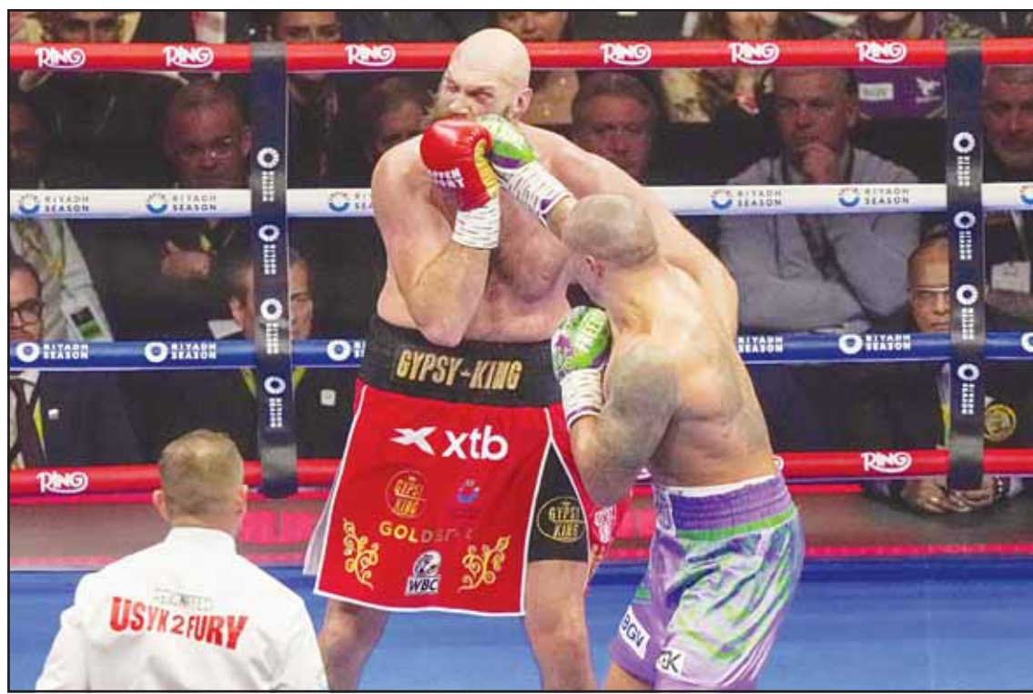
Boxers Britain's Tyson Fury, left, and Ukraine's Oleksandr Usyk compete during their WBA, WBO, and WBC heavyweight title fight in Riyadh, Saudi Arabia.

In the second half of the fight, it became apparent that carrying the extra weight was wearing Fury down, as the