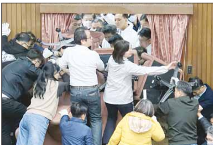
In this image made from video by Taiwan's EBC, lawmakers from the Democratic Progressive Party use chairs to block the entrance as members of the Nationalist Party, or Kuomintang try to break into the Legislature in Taipei, Taiwan on Friday, Dec. 20, 2024.

The $571 million in military assistance comes on top of Biden's authorization of $567 million for the same purposes in late September. The military sales include $265 million for about 300 tactical radio systems and