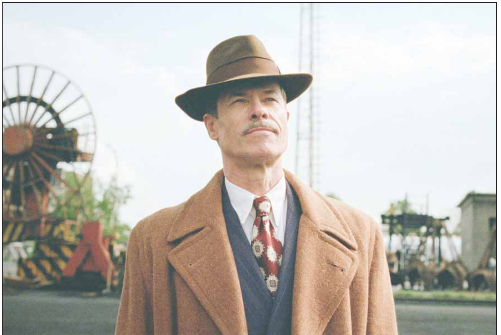
This image released by A24 shows Guy Pearce in a scene from 'The Brutalist.'

Postwar epic defies Hollywood conventions