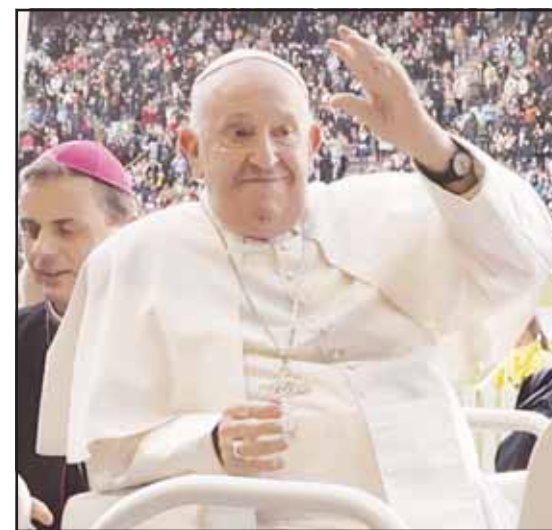
Pope Francis waves as he arrives to lead the holy mass, at the King Baudouin stadium in Brussels, Belgium, Sunday, Sept. 29, 2024.

The Vatican's saint-making process usually takes years, decades or even centuries and typically begins