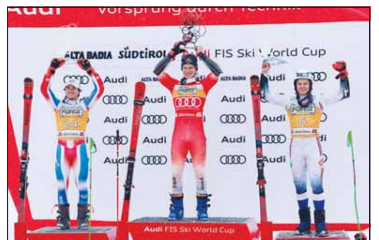
Switzerland's Marco Odermatt, center, winner of an alpine ski, men's World Cup giant slalom, celebrates with second-placed France's Leo Anguenot, left, and third-placed Norway's Alexander Steen Olsen, in Alta Badia, Italy.

The Gran Risa is already one of the toughest courses on the circuit and it was made even more difficult by flat light, while there were also plenty of ruts and bumps on the course - although that was improved between the first and second run.