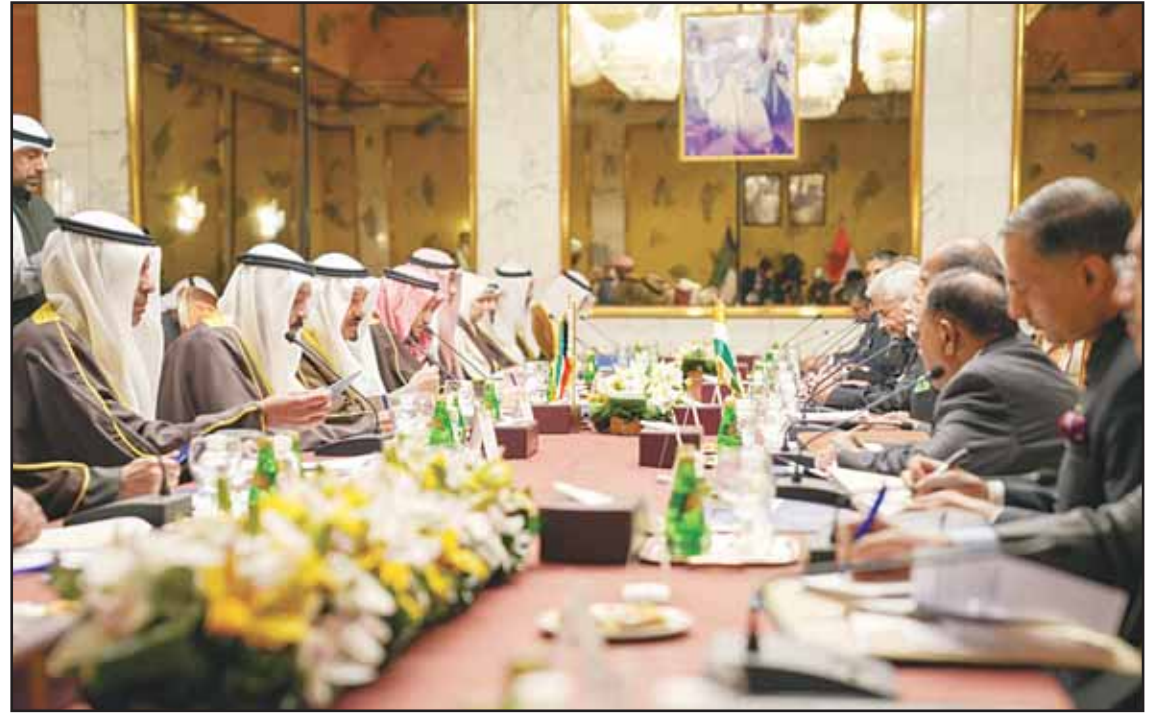
PM Diwan photo Official talks between Kuwait and India.

Modi dedicates honor to enduring friendship