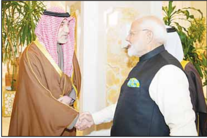
PM Narendra Modi meets the First Deputy Prime Minister, Minister of Defense and Minister of Interior Sheikh Fahad Yousef Saud Al-Sabah.