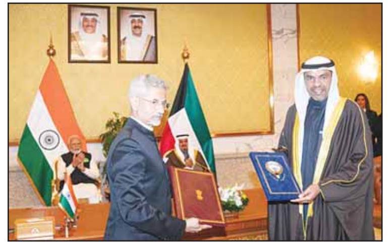
Foreign Minister Abdullah Al-Yahya with External Affairs Minister Dr. Subrahmanyam Jaishankar after signing the agreement.

Kuwaiti cabinet members and senior officials, in addition to the Indian delegation accompanying Premier Modi.