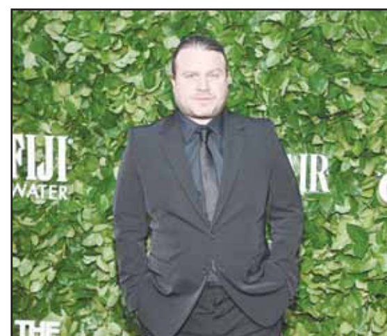
Filmmaker Brady Corbet appears at The Gotham Film Awards in New York on Dec. 2, 2024.

Corbet already sounds delighted that his next project - a '70s-set horror Western - will further test whatever popularity has come his way thanks to "The Brutalist."