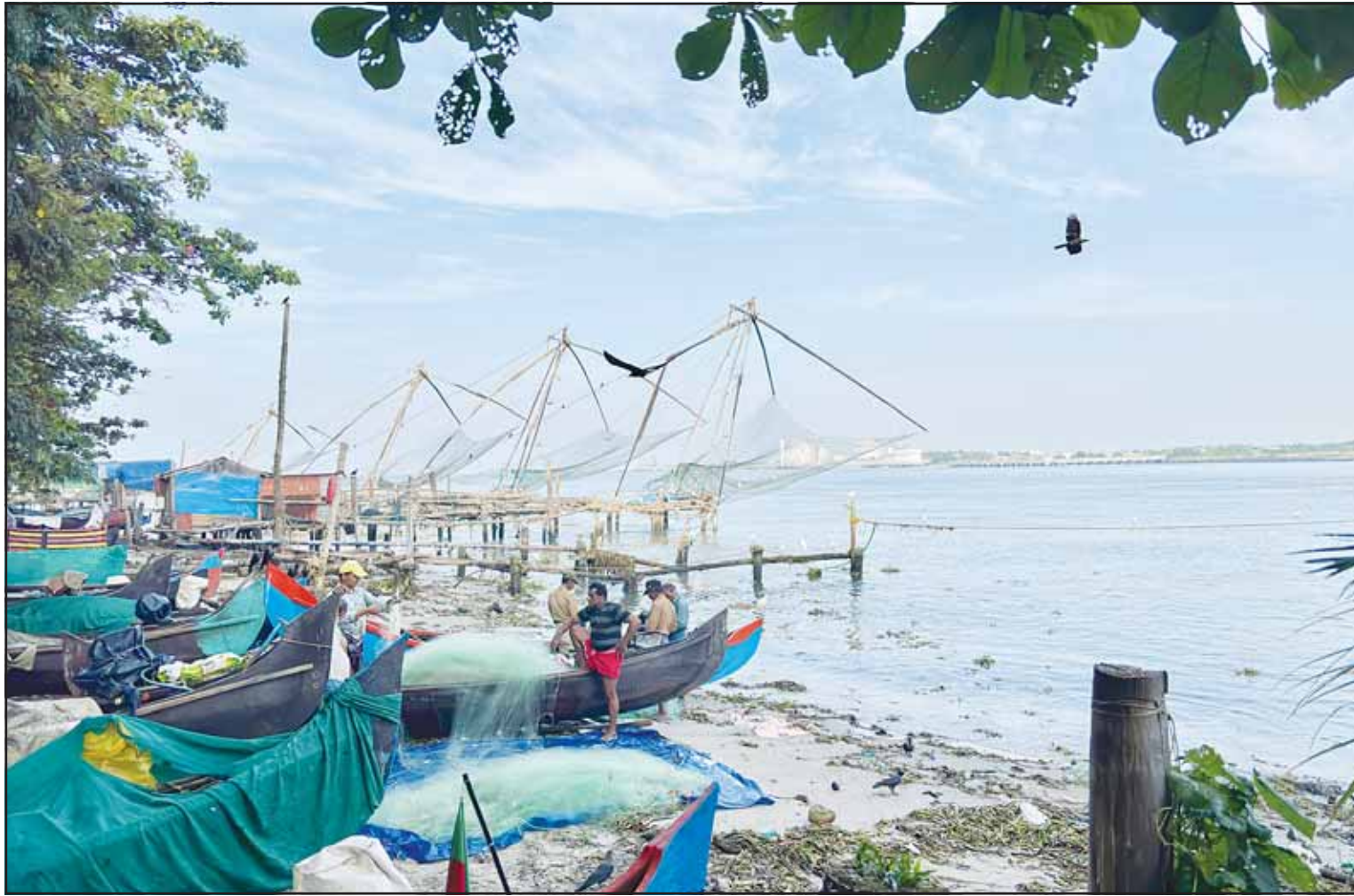
Fishermen arrange their nets after returning from fishing on the coast of the Arabian Sea, against the backdrop of Chinese fishing nets, or lift nets, in Kochi, India, Sunday, Dec. 22, 2024.