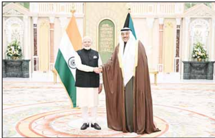
His Highness the Crown Prince hosts a luncheon in honor of the Prime Minister of the Republic of India on the occasion of his official visit to the country.

Kuwait's First Deputy Prime Minister, Minister of Defense and Minister