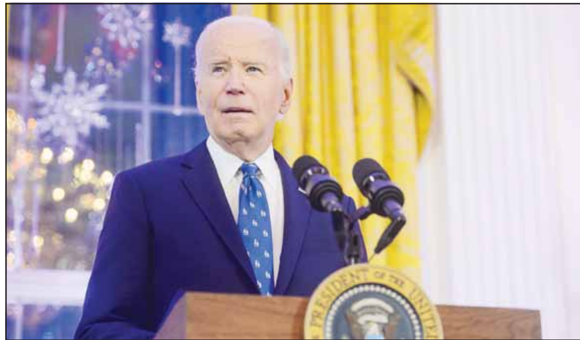
President Joe Biden speaks during a Hanukkah reception in the East Room of the White House in Washington, Dec. 16, 2024.

Yet Trump's last-minute debt limit demand was almost an impossible ask, and Johnson had almost no choice but to work around that pressure. The speaker knew there wouldn't be enough support within the slim Republican majority alone to pass any funding package because many Republican