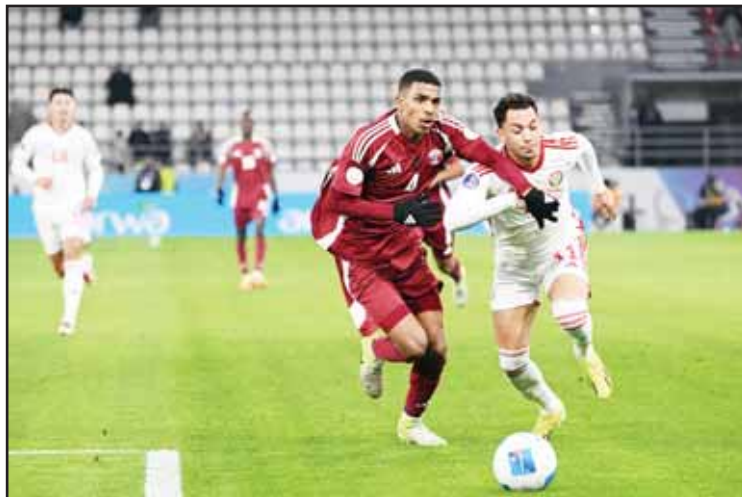
Players go for the ball during Qatar and UAE match.