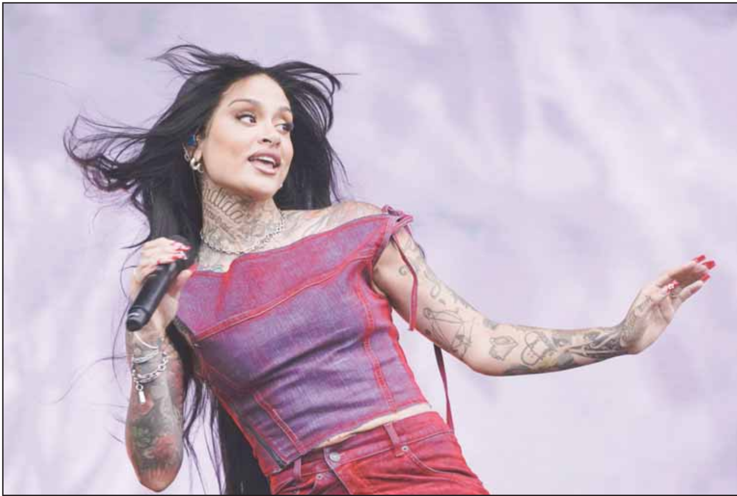
Kehlani performs at All Points East festival on Aug. 18, 2023, in London.

'Crash' explores new sounds, personal growth