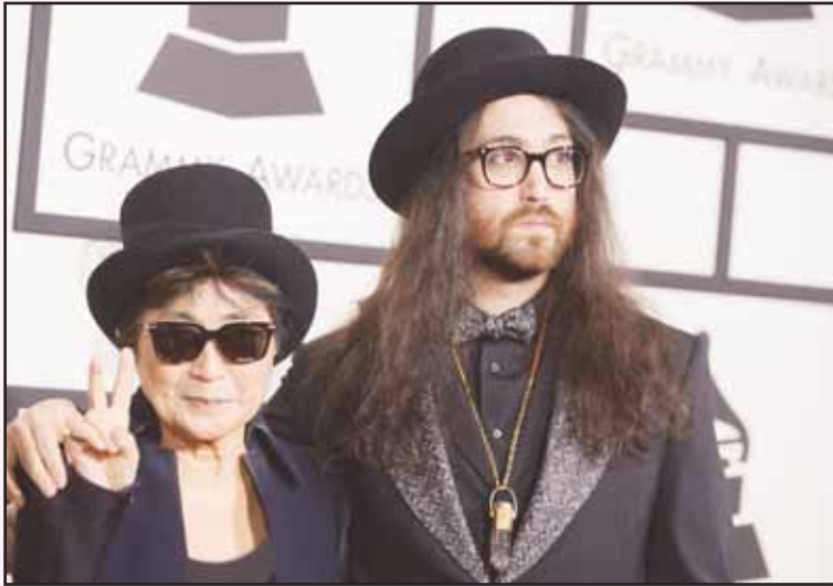
Yoko Ono, wife of the late John Lennon, (left), and their son Sean Lennon arrive at the 56th annual Grammy Awards in Los Angeles on Jan. 26, 2014.

NEW YORK, Dec 22, — Only recently given stewardship over his late father's work, Sean Ono Lennon is on a remarkable run.