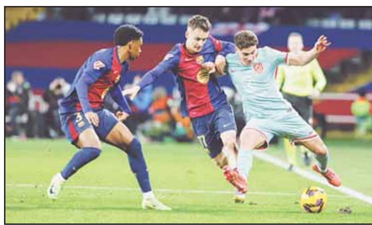
Atletico Madrid's Julian Alvarez, right, duels for the ball with Barcelona's Marc Casado, center, and Barcelona's Alejandro Balde during the Spanish La Liga soccer match between Barcelona and Atletico Madrid at the Lluís Companys Olympic Stadium in Barcelona, Spain.

Worse was to come for Barcelona as, in the sixth minute of stoppage time, Nahuel Molina made a fantastic run to latch onto a through ball and cross in for Sørloth to fire into the back of the net.