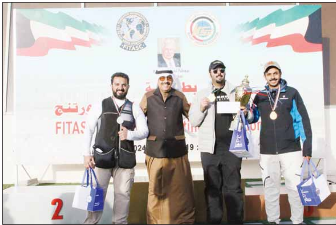
Winners celebrate on the podium.