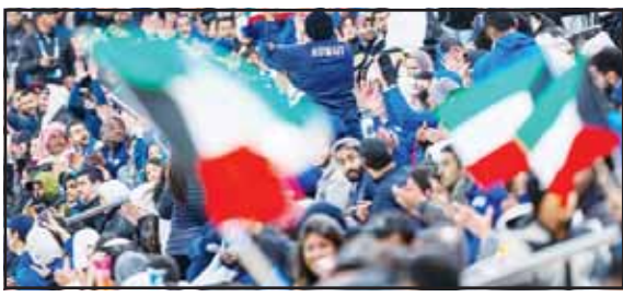
Kuwaiti fans cheer on the national team during the opening match between Kuwait and Oman.