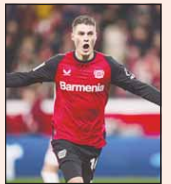
Leverkusen's Patrik Schick celebrates after scoring his side's third goal during the German Bundesliga soccer match between Bayer 04 Leverkusen and SC Freiburg in Leverkusen, Germany.

Santos had already conceded an unfortunate own goal. The 'keeper played out a short pass to Skhiri, who was immediately under pressure from two Mainz players. Skhiri sent the ball looping back