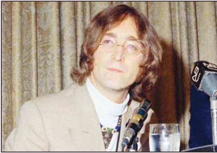
Singer John Lennon appears during a press conference at the Hotel Americana on May 13, 1968, in New York.