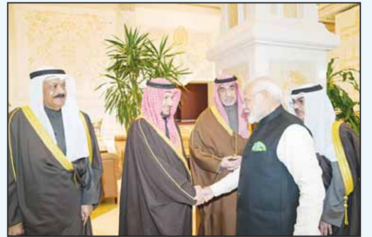
PM Narendra Modi meets the Deputy Prime Minister and Minister of State for Cabinet Affairs Sherida Al-Mousherji.

KUWAIT CITY, Dec 22, (KUNA): His Highness the Prime Minister Sheikh Ahmad Abdullah Al-Ahmad Al-Sabah received on Sunday at Bayan Palace the visiting Indian Prime Minister Narendra Modi and his accompanying delegation.