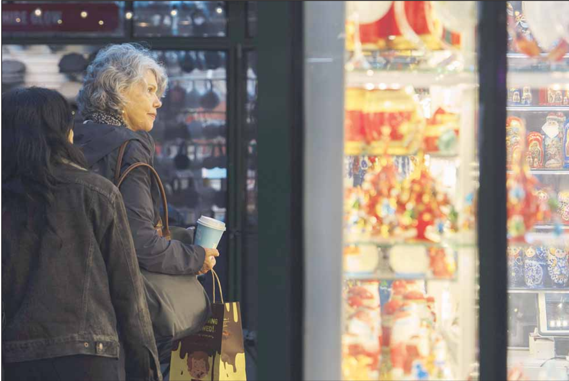
People window shop in Bryant Park's Winter Village, Tuesday, Nov. 26, 2024, New York.

The Conversation is an independent and nonprofit source of news, analysis and commentary from academic experts.