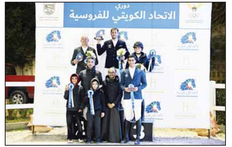
Grand Prix riders on the podium.