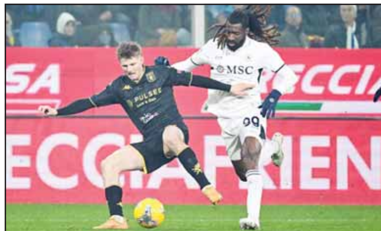
Genoa's Morten Frendrup, left, fights for the ball with Napoli's Andre-Frank Zambo Anguissa during the Serie A soccer match between Genoa and Napoli at the Luigi Ferraris Stadium in Genoa, Italy.

The 34-year-old was sent on with seven minutes remaining against Napoli and almost had an immediate impact as Andrea Pinamonti's glancing header clipped Balotelli's knee but goalkeeper Alex Meret managed to push it off the post. It was one of several decisive saves by Meret in the