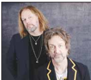
Rich Robinson, (left), and his brother Chris Robinson of The Black Crowes pose for a portrait in Los Angeles on Monday, Dec. 9.

"Well, we did it and we've been successful. And all these years later we wrote these new songs and, boom, here we are," says Chris Robinson. "The validation of that is really unique to us."