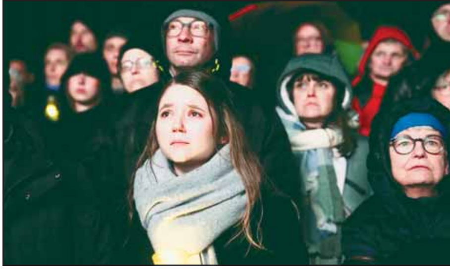
People outside Magdeburg Cathedral follow a memorial service for victims of Friday's Christmas Market attack, where a car drove into a crowd, in Magdeburg, Germany, Saturday, Dec. 21, 2024. (AP)

MAGDEBURG, Germany, Dec 22, (AP): More details emerged Sunday about those killed when a man drove a car at speed through a Christmas market in Germany, while mourners continued to place flowers and other tributes at the site of the attack.