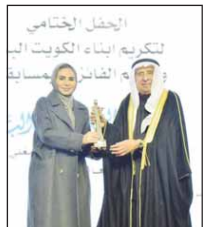
Minister of Social Affairs during her patronage of the conclusion of the 'Al-Baghli Award'.

In line with our responsibility at the Ministry of Social Affairs, we have been keen about supporting the Al-Baghli Obedient Child Award since its inception in 2007. Over the past 18 years, this award has played a key role in raising community awareness about the importance of honoring parents and caring for the elderly. This reflects our dedication to developing programs and initiatives that meet the aspirations of our society.