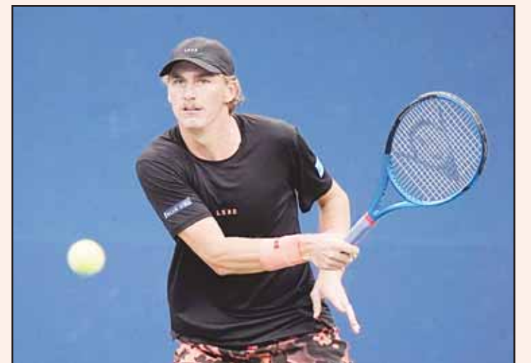
In this file photo, Max Purcell returns a shot to Tommy Paul, of the United States, during a second round match of the U.S. Open tennis championships in New York.

Top-ranked men's player Jan-nik Sinner, winner of two Grand Slams this year, was exonerated by the ITIA after twice testing positive for a trace amount of an anabolic steroid in March with the World Anti-Doping Agency appealing the ruling.