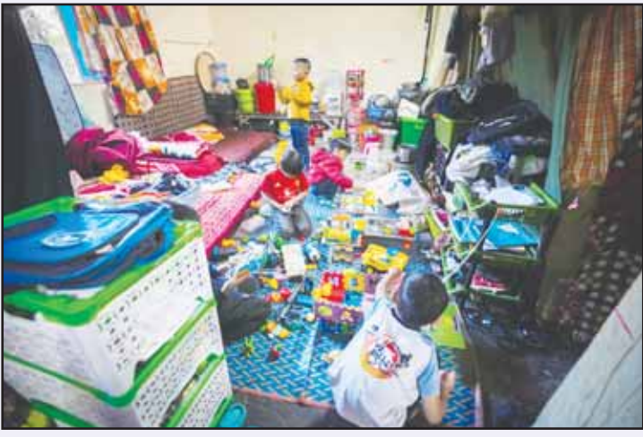
Kuki tribal children play in a relief camp in Kangpokpi, Manipur, Sunday, Dec. 15, 2024.