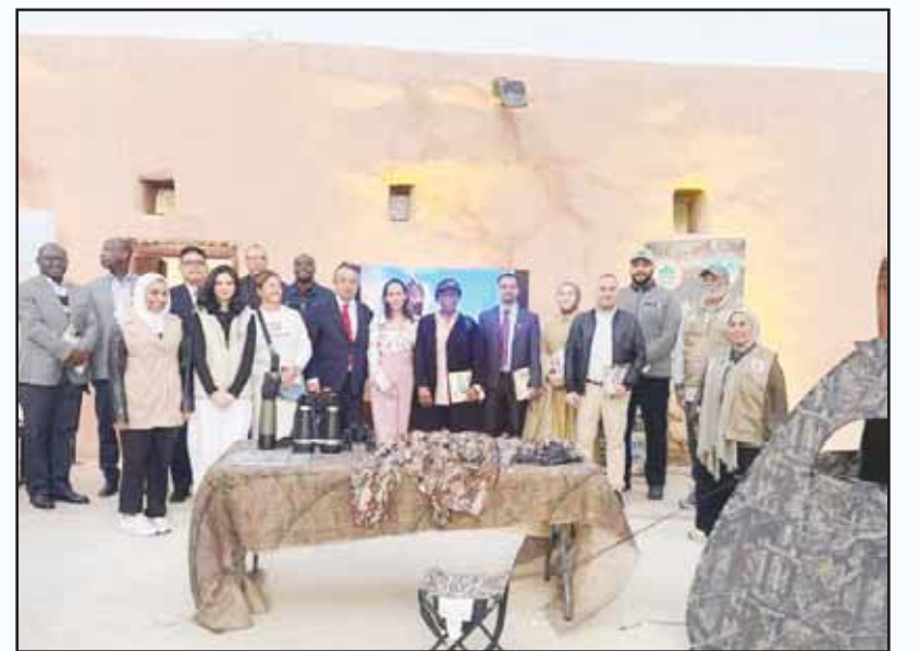
Group photo of diplomatic delegation with youth and members of the Environmental Protection Association.

This initiative aligns with the Society's long-standing success in engaging the diplomatic community in such projects.