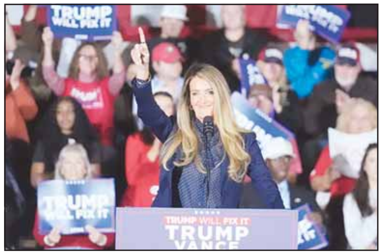
Former Sen. Kelly Loeffler speaks before Republican vice presidential nominee Sen. JD Vance, at a campaign event on Nov. 4, 2024, in Atlanta.

Meanwhile, analysts say there is an "affordability shift" taking place across the industry, led by people who feel they cannot afford to pay nearly $50,000 for a new vehicle. In America, a vital market for companies like Nissan, Honda and Toyota, that's forcing automakers to consider lower pricing, which will eat further into industry profits.