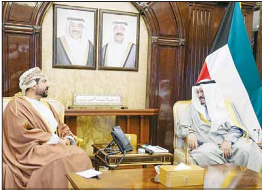
His Highness the Prime Minister Sheikh Ahmad Abdullah Al-Ahmad Al-Sabah meets the visiting Oman's Minister of Commerce, Industry and Investment Promotion, Qais bin Mohammad Al-Yusuf.