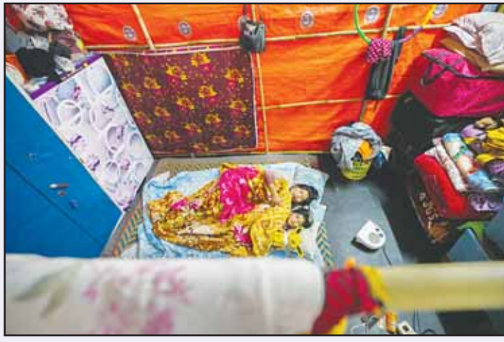
A Kuki tribal woman and her daughter rest in a relief camp in Kangpokpi, Manipur, Sunday, Dec. 15, 2024.