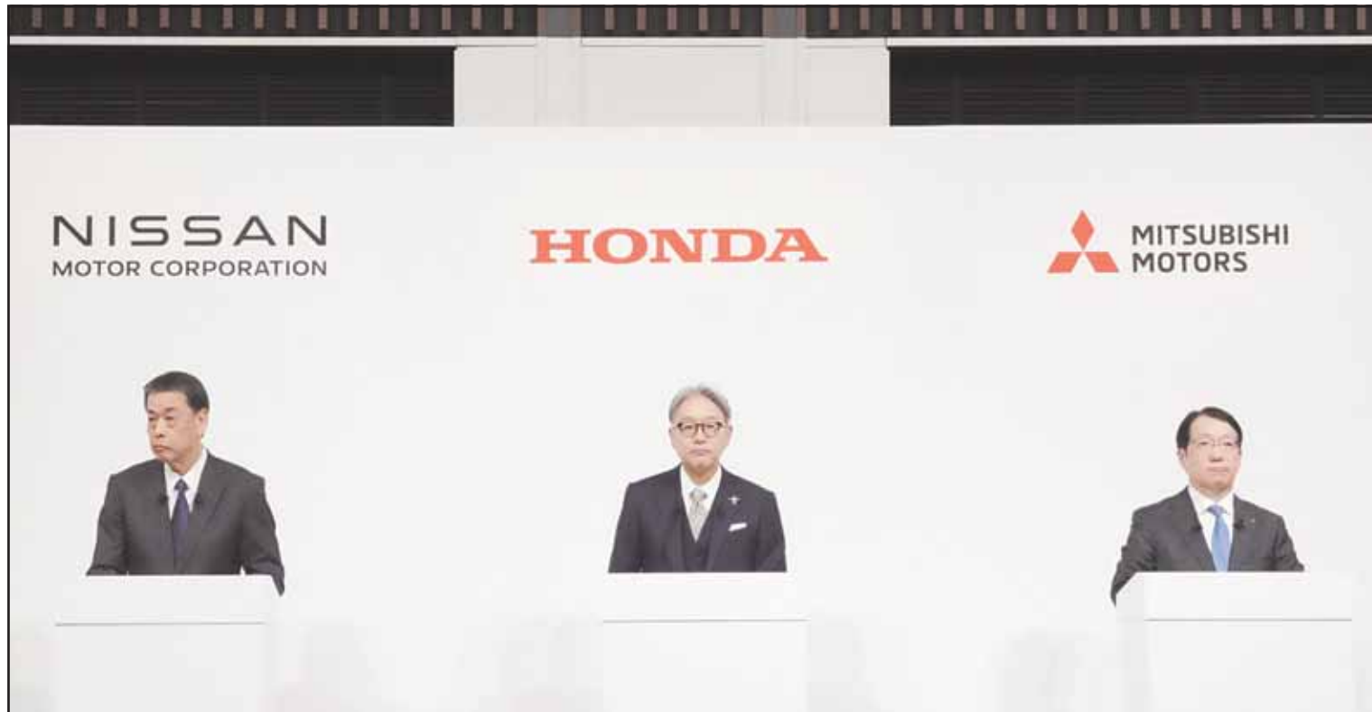
Nissan Chief Executive Makoto Uchida, left, Honda Chief Executive Toshihiro Mibe, center, and Takao Kato, CEO of Mitsubishi Motors, right, attend a joint news conference in Tokyo, Japan, Monday, Dec. 23, 2024.

Joining forces would help the smaller Japanese automakers add scale to com-