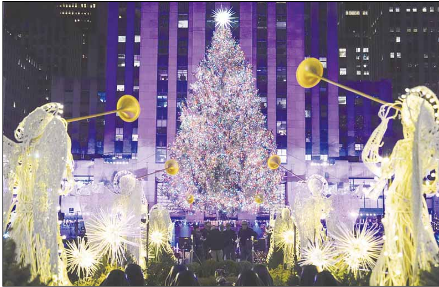
The Rockefeller Center Christmas tree after being lit during the 92nd annual Rockefeller Center Christmas tree lighting ceremony, Wednesday, Dec. 4, 2024, in New York.