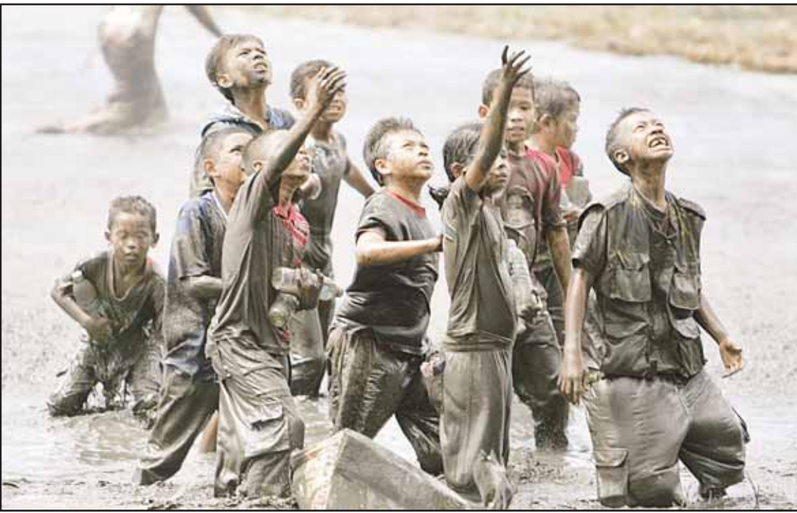
Refugee children try to catch relief goods tossed from an Australian military helicopter in a rice paddy in Lampaya, outskirts of Banda Aceh, Indonesia, Jan. 17, 2005.

India's opposition parties have been urging Modi to visit Manipur. Modi has not visited the state since the violence started but has instructed his home minister, Amit Shah, to find a solution.