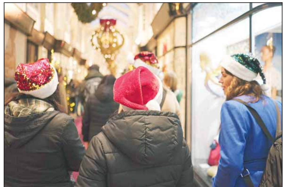
Christmas shoppers out wearing seasonal hats in central London, Friday, Dec. 13, 2024. Britain's economy unexpectedly shrank by 0.1 percent in October. The Office for National Statistics stated in figures released Friday.

Inflation in the U.K. has risen to its highest level since March, driven by an increase in fuel prices last month, of-