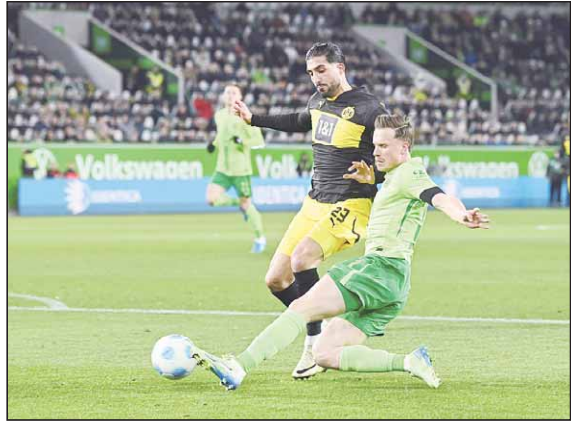
Dortmund's Emre Can, left, and Wolfsburg's Yannick Gerhardt fight for the ball during the Bundesliga soccer match between VfL Wolfsburg and Borussia Dortmund, in Wolfsburg, Germany.

"We're at the end of another 'English week' (with mid-week games) again," Heidenheim coach Frank Schmidt said. "Everyone did their best, but we have to be honest - it wasn't enough."