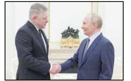
Russian President Vladimir Putin, right, and Slovak Prime Minister Robert Fico greet each other during their meeting at the Kremlin in Moscow, Russia, Sunday, Dec. 22, 2024.

MOSCOW, Dec 23, Russian President Vladimir Putin on Sunday hosted Slovakia's prime minister, Robert Fico, in a rare visit to the Kremlin by an EU leader since Moscow's all-out invasion of Ukraine in February 2022. Fico arrived in Russia on a "working visit" and met with Putin one-on-one on Sunday evening, Kremlin spokesman Dmitry Peskov told Russia's RIA news agency. According to Peskov, the talks were expected to focus on "the international situation" and Russian natural gas deliveries. Russian natural gas still flows to some European countries, including Slovakia, through Ukraine under a five-year agreement signed before the war that is due to expire at the end of this year. At a summit in Brussels on Thursday, Ukrainian President Volodymyr Zelenskyy told EU leaders that Kyiv has no intention of renewing the deal, something Fico insisted will harm his country's interests. Fico said on Facebook after meeting with Putin that he informed European Union leaders about his trip on Friday. He said the talks in Moscow were a reaction to what Zelenskyy told him on Thursday in Brussels, that he is against any gas transit to Slovakia through Ukraine. Fico also said that Zelenskyy is in favor of sanctions against Russia's nuclear program, which he said was unacceptable and against the interest of his country that relies on nu