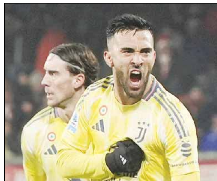
Juventus' Nico Gonzalez celebrates after scoring during the Serie A soccer match between Ac Monza and Juventus at U-Power Stadium in Monza, Italy.