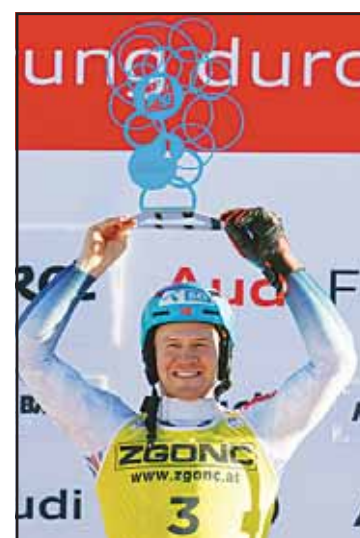
Norway's Timon Haugan celebrates on the podium after winning an alpine ski, men's World Cup slalom, in Alta Badia, Italy.

eight days ago with Henrik Kristoffersen finishing ahead of McGrath.