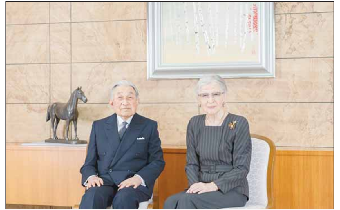
This handout photo taken on Dec. 11, 2024 by the Imperial Household Agency of Japan and released on Dec. 23, 2024 shows Japan's former emperor Akihito, left, and former empress Michiko as they pose for photos at their residence in Tokyo. Japan's former emperor Akihito turned 91 on Dec. 23. (AP)

The Aceh Tsunami Museum in Banda Aceh houses photos of the aftermath and vehicle debris, serving as a constant reminder of what was lost that day. Local authorities have also turned a former floating diesel-powered power plant barge that washed about 6 kilometers (about 4 miles) inland by the tsunami into another memorial place.