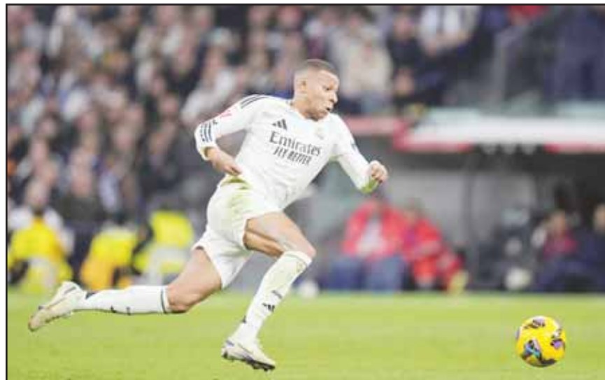
Real Madrid's Kylian Mbappé runs to the ball during the Spanish La Liga soccer match between Real Madrid and Sevilla at the Santiago Bernabeu Stadium in Madrid, Spain.

Sevilla, sitting in 14th place, had won two of its last two games in all competi-