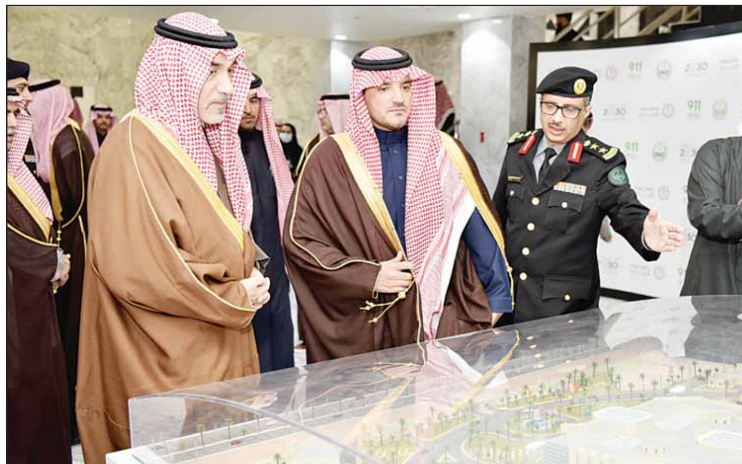
KUWAIT CITY, Dec 23, (KUNA): The official gazette (Kuwait Alyoum) published in its latest edition released on Monday the decree-into-law 116/2024, amending provisions of the Amiri Decree 15/1959 regarding the Kuwaiti citizenship.

Sheikh Fahad to meet with editors-in-chief of local dailies