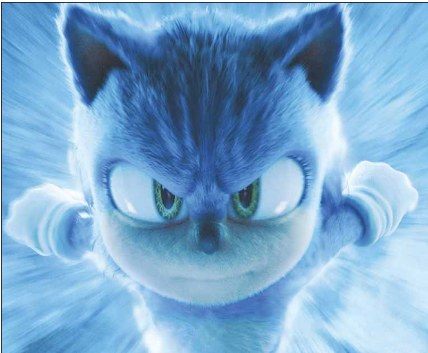
This image released by Paramount Pictures and Sega of America shows the character Sonic, voiced by Ben Schwartz, in a scene from 'Sonic the Hedgehog 3.'