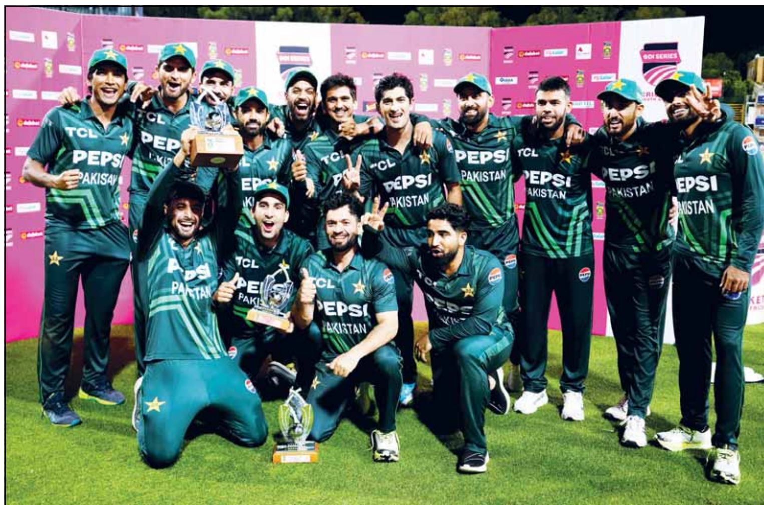
Pakistan's players pose with the trophy following the third International cricket match between South Africa and Pakistan, at the Wanderers stadium in Johannesburg, South Africa.