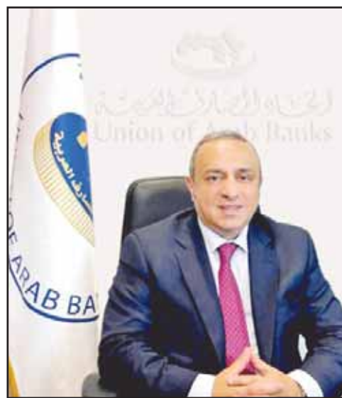
Secretary-General of the Union Wissam Fattouh.

In terms of total assets, Kuwait Finance House led locally and ranked eighth regionally, followed by National Bank of Kuwait in second place locally and ninth regionally.