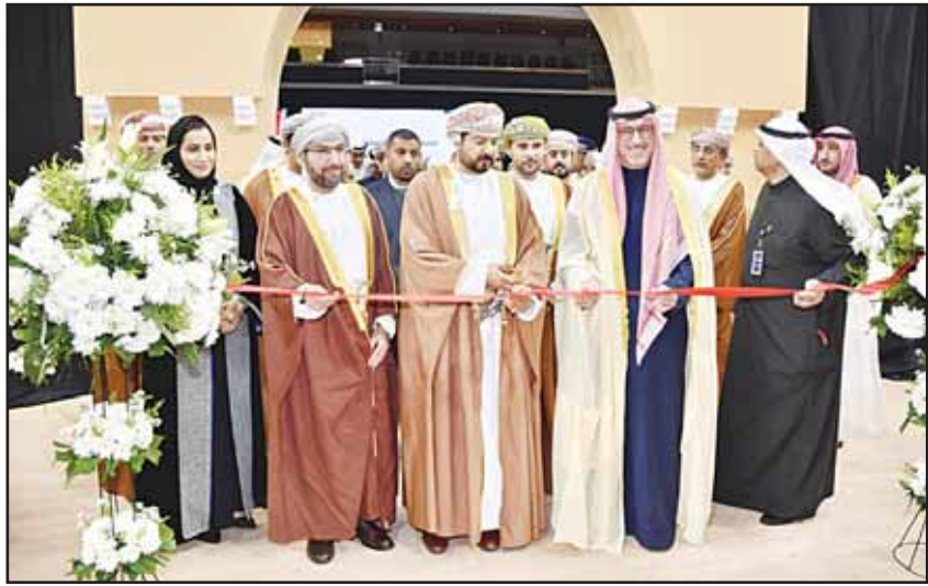
The Kuwaiti and Omani Ministers of Commerce attended the opening of the exhibition held alongside the forum, featuring participation from 70 small and medium enterprises.