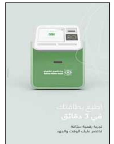
Card printing service

For the second time at the local banking level, KFH maintains its leadership by introducing instant credit and prepaid card issuance through its ATMs without prior request. This service is now accessible at all branches and selected shopping malls, solidifying KFH's position as the leader with the