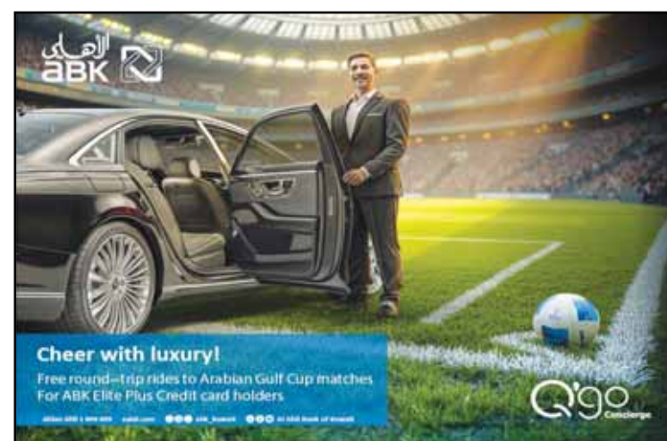
ABK-Khaleeji 26 special initiative for its Elite customers.