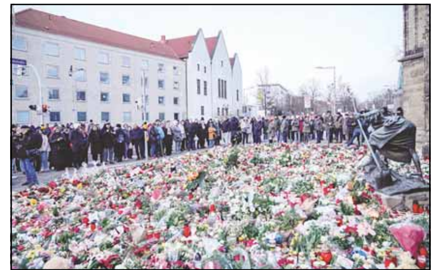
People lay flowers and lit candles in front of the Johann church close to the Christmas market, where a car drove into a crowd on Friday evening, in Magdeburg, Germany, Sunday, Dec. 22, 2024.