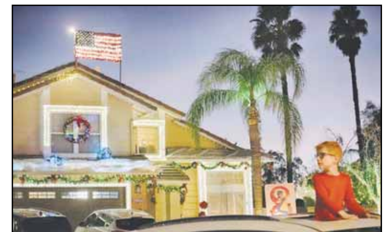
Local residents drive through the Wakefield Winter Wonderland neighborhood decorated with Christmas lights in Santa Clarita, Calif. on Dec. 17, 2024.