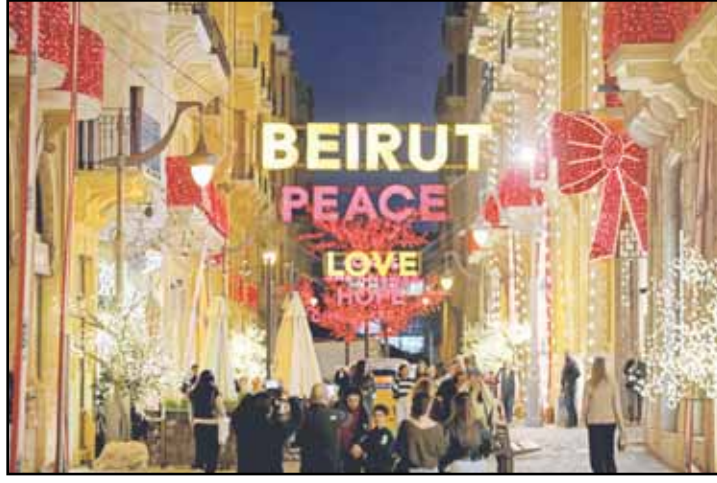
Christmas decorations are seen on a street in downtown Beirut, Lebanon, on Dec. 18, 2024.