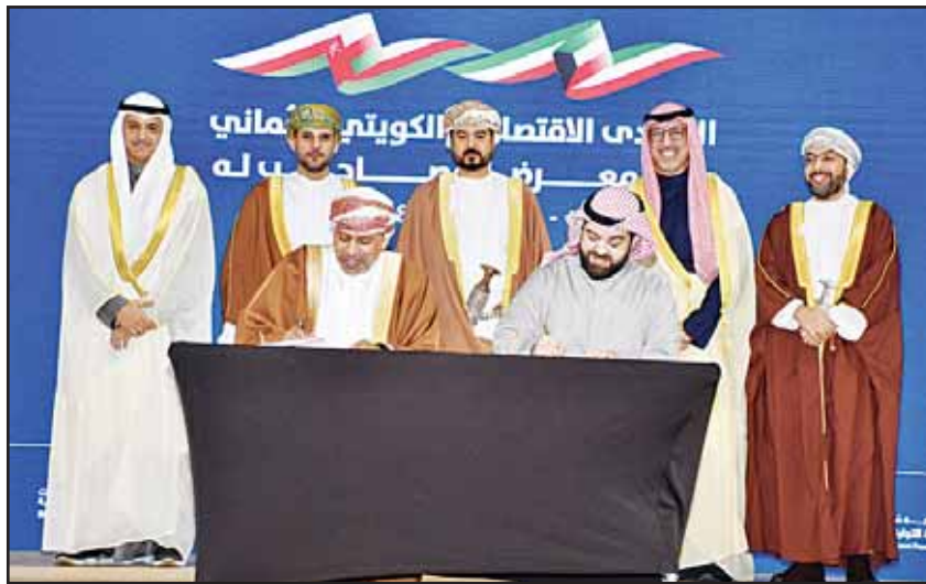
Oman and Kuwait signed a cooperation agreement to strengthen collaboration across various fields.