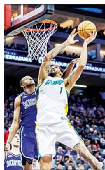
Indiana Pacers forward Obi Toppin (1) draws a foul on Sacramento Kings guard De'Aaron Fox during the second half of an NBA basketball game in Sacramento, Calif.

In New Orleans, Nikola Jokic overcame a slow scoring start for his ninth triple-double of the season, finishing with 27 points, 13