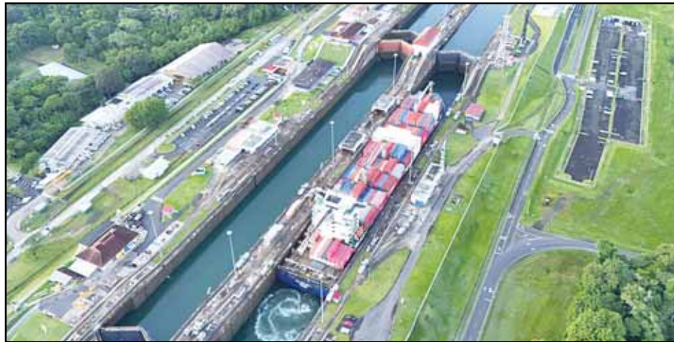
A cargo ship traverses the Agua Clara Locks of the Panama Canal in Colon, Panama, Sept. 2, 2024.

PHOENIX, Dec 23, Donald Trump suggested that his new administration could try to regain control of the Panama Canal that the United States "foolishly" ceded to its Central American ally, contending that shippers are charged "ridiculous" fees to pass through the vital transportation channel linking the Atlantic and Pacific Oceans. Panama's conservative president José Raúl Mulino, who was elected in May on a pro-business platform, roundly rejected that notion as an affront to his country's sovereignty. The Republican president-elect's comment came during his first major rally since winning the White House on Nov. 5. He also basked in his return to power as a large audience of conservatives cheered along. It was a display of party unity at odds with a just-concluded budget fight on Capitol Hill, where some GOP lawmakers openly defied their leader's demands. Addressing supporters at Turning Point USA's AmericaFest in Arizona, Trump pledged that his "dream team Cabinet" would deliver a booming economy, seal U.S. borders and quickly settle wars in the Middle East and Ukraine. "I can proudly proclaim that the Golden Age of America is upon us," Trump said. "There's a spirit that we have now that we didn't have just a short while ago." His appearance capped a four-day pep rally that drew more than 20,000 activists and projected an image of Republican cohesion despite the past week's turbulence in Washington with Trump