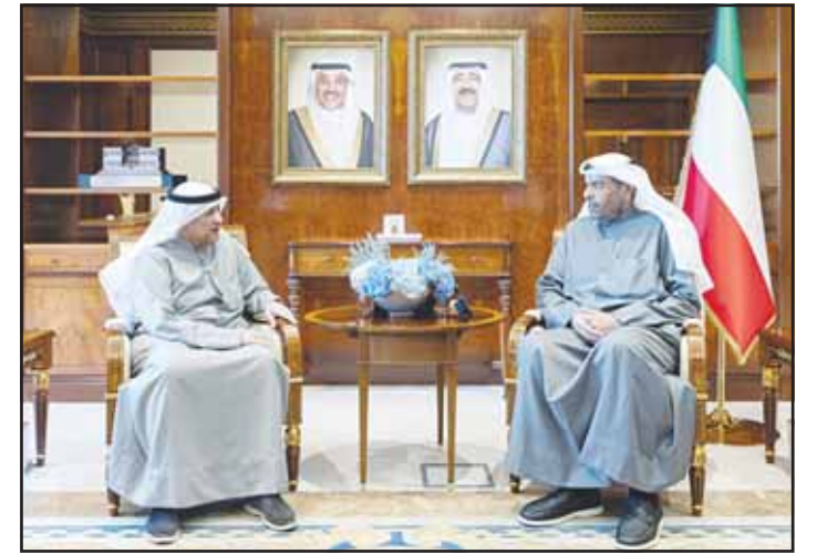
Foreign Minister Abdullah Al-Yahya during his meeting with the Secretary-General of the Gulf Cooperation Council, Jassem Al-Budaiwi.

This visit comes within the framework of ongoing efforts to strengthen relations between the GCC countries and enhance integration in various vital fields to achieve the aspirations of the Gulf people for sustainable development and prosperity.