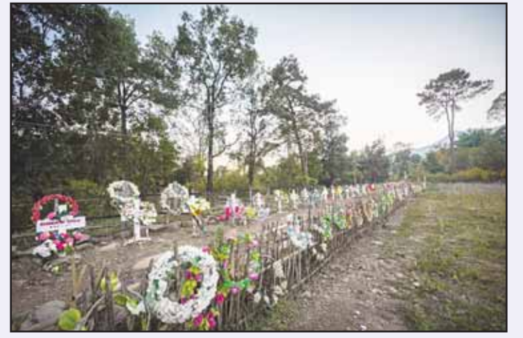
Flowers are placed at a burial ground of Kuki victims died during Kuki and Meitei clashes in Kangpokpi, Manipur, Sunday, Dec. 15, 2024.

Struggles of living in a relief center are taking a toll on health