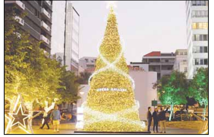
A Christmas tree is seen in downtown Beirut, Lebanon, on Dec. 18, 2024.