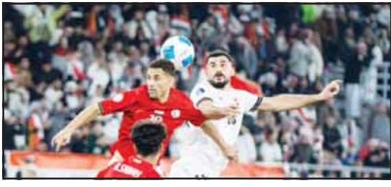
Iraq and Yemen players in an aerial battle during the Khaleeji Zain 26 match in Kuwait.