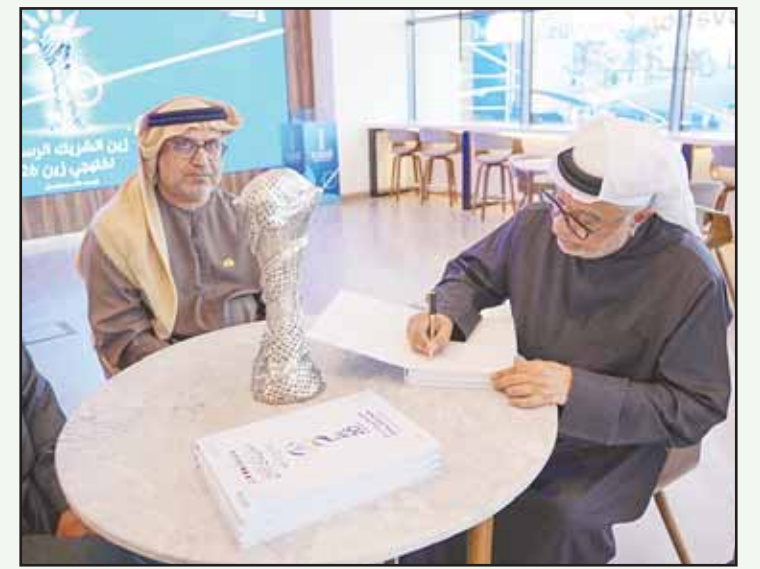
Al-Jokar signs copies of the book with Ambassador Al-Neyadi in attendance.

showcased the heritage and cultures of Gulf nations, embodying a shared sense of unity, vision, and identity. The performances vividly depicted Gulf life on land and sea, brought to life with advanced technologies, aligning with the tournament's slogan, 'The Future is Gulf.'