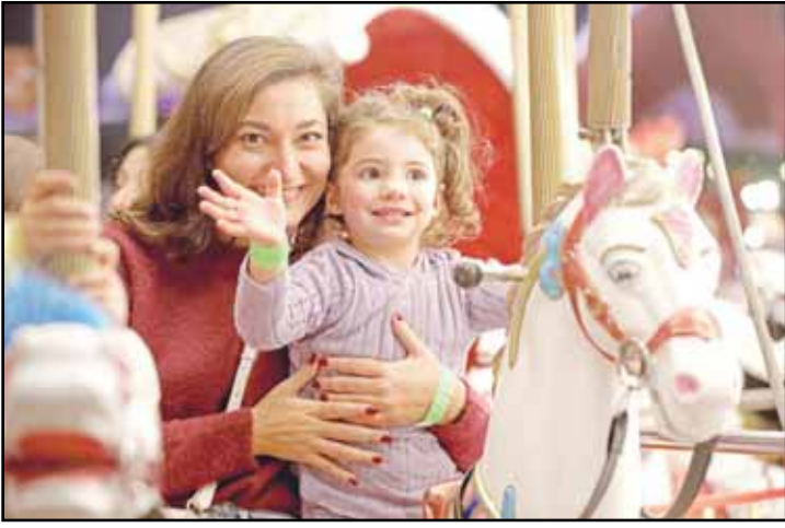
People enjoy themselves in celebration of the upcoming Christmas in Beirut, Lebanon, on Dec. 21, 2024.