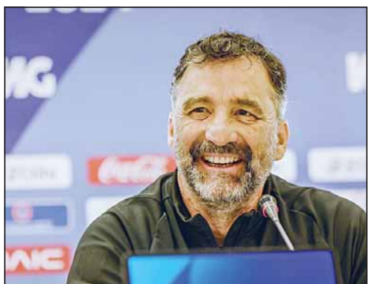
Left-right: Juan Pizzi and Paulo Bento speak to reporters on the eve of the match between Kuwait and UAE.

On the upcoming clash with Oman, Garcia described it as a tough match. "The Omani team is strong, with counterattacks being one of their key strengths. Football, like life, has its ups and downs," he said. Garcia emphasized his desire for the team to perform at its best, recalling its victorious run in the Asian Cup. He concluded, "To compete effectively, we must adapt to the opponent's style. Just like we played the UAE match in an open manner, we aim to approach the Omani match with the same mentality and secure a victory."