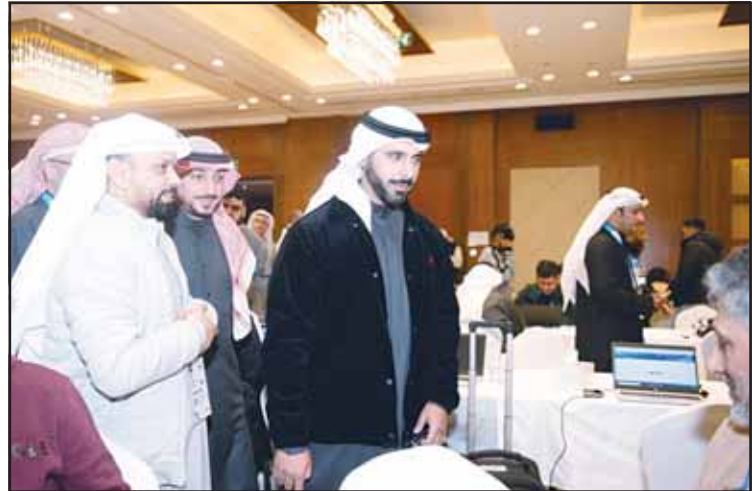
Sheikh Mubarak Fahad Jaber Al-Ahmad visits media center.

Minister of Information and Culture and Minister of State for Youth