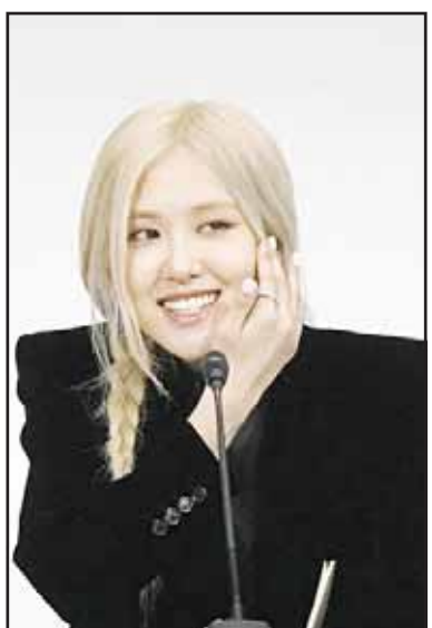
Rosé speaks during a discussion on mental health at the Apple campus in Cupertino, Calif. on Nov 17, 2023.

The album is an emotional rollercoaster easy to empathize with, stuffed with songs that articulate the trials and tribulations of early adult years - the search for connection and getting dragged into romances that lead nowhere. But throughout, fans of both Blackpink and Rosé might miss the spirited songs of her group. After all - your 20s are for partying, too - not just heartbreak.