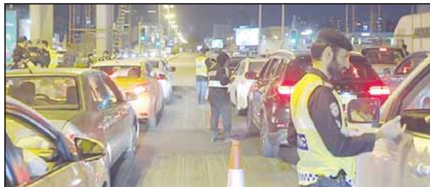
Traffic police checking in progress.

As a result, all seven defendants were acquitted of the charges, with the court emphasizing the absence of concrete evidence and the prevalence of doubt in the case.