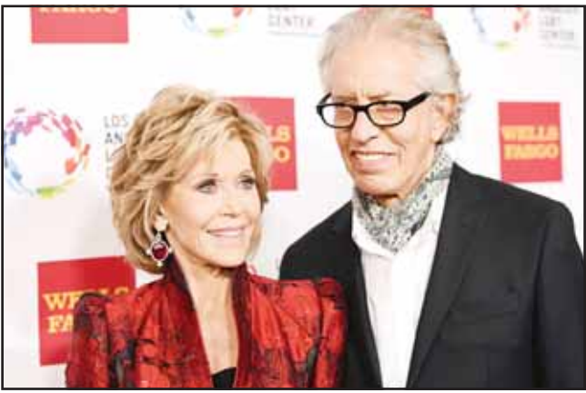
Jane Fonda, (left), and Richard Perry pose for a photo at the Los Angeles Center's 46th Anniversary Gala Vanguard Awards at the Hyatt Regency Century Plaza in Los Angeles, Nov. 7, 2015.