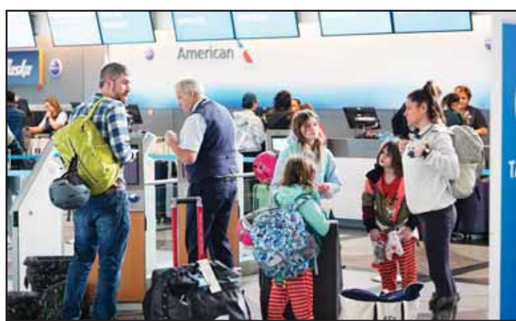
Travellers queue up at the American Airlines self-check-in kiosks in Denver International Airport Tuesday, Dec. 24, 2024, in Denver.