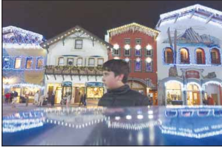
A child walks past a trash can along Front Street on Wednesday, Nov. 27, 2024, in Leavenworth, Wash. (AP)