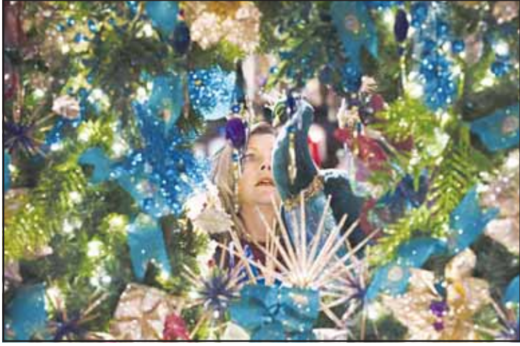
A person looks at a peacock display at Kris Kringl on Saturday, Nov. 30, 2024, in Leavenworth, Wash.