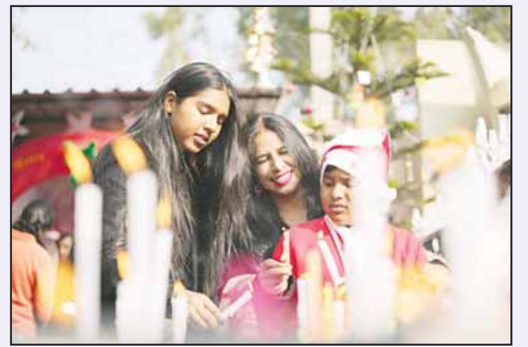
Indian devotees light candles during Christmas at St. Mary's Garrison Church, in Jammu, India, Wednesday, Dec. 25, 2024.