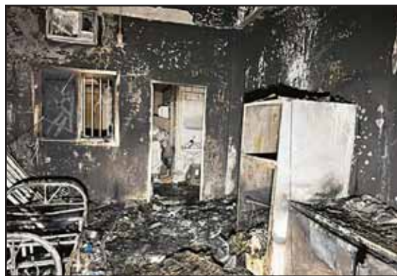
Fire destroys a room in the house.

According to security sources, such campaigns will continue in all governorates to apprehend wanted individuals and violators, curb the spread of crime, and address negative phenomena.