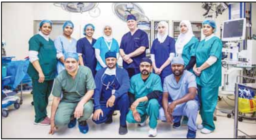
Medical staff in the organ transplant department at Jaber Hospital.

Dedicated team performs 149 kidney transplants in 2024