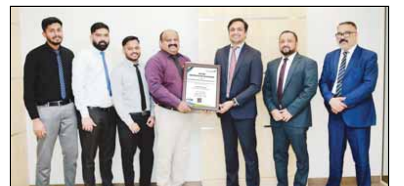
LuLu Hypermarket presented with PCI DSS certification.

Given LuLu Hypermarket's expansive operations and the increasing challenges posed by evolving cybersecurity threats, implementing a secure data protection system aligned with international standards, has been paramount. The PCI DSS certification validates these efforts and reinforces the hypermarket's resilience against potential data breaches, safeguarding its financial stability and reputation.