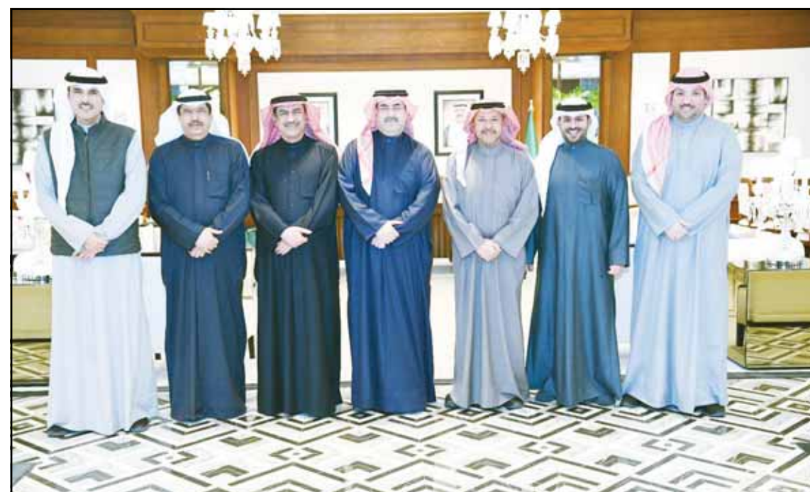
Farwaniya Governorate photo

The Catholic Church also announced the opening of its diwaniya to receive well-wishers on the occasion of Christmas and the New Year today, Thursday, December 26, from 6:00 pm to 9:00 pm and welcomed everyone to join in the celebration.