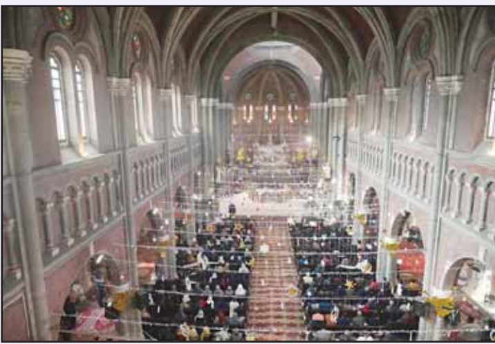
Christians attend the Christmas Mass at Sacred Heart Cathedral Church, in Lahore, Pakistan, Wednesday, Dec. 25, 2024.