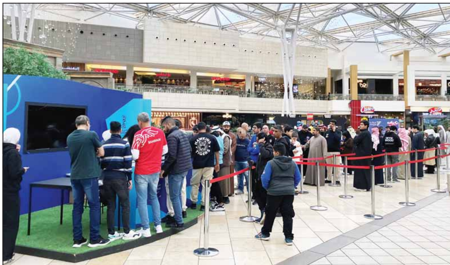
Large crowd came out for tickets.

KUWAIT CITY, Dec 25: The demand for tickets to watch Khaleeji Zain 26 matches has gone through the roof following Kuwait's dramatic 2-1 win over UAE on Tuesday night.