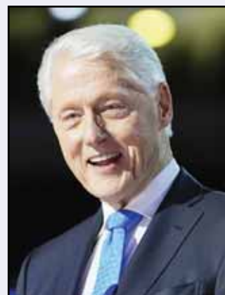
Former President Bill Clinton speaks during the Democratic National Convention, on Aug. 21, 2024, in Chicago.