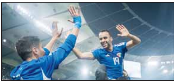
Players celebrate after their vital win over UAE in Khaleeji Zain 26 in Kuwait.