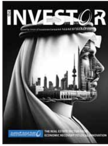
The Investor Issue 20 cover

The magazine features in-depth articles and analyses, including a comprehensive overview of Kuwait's real estate market, key ongoing and upcoming projects, and success stories of leading developers. A key highlight is the global economic trends report, "2024: A Year of Calm After