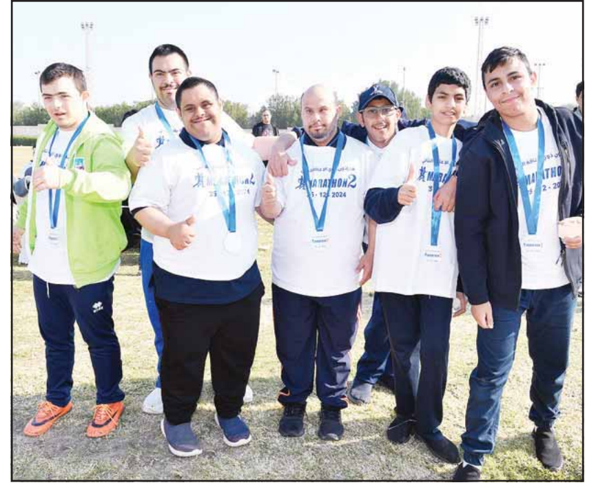
Participants in the marathon for physically challenged people were honored by the organizers.