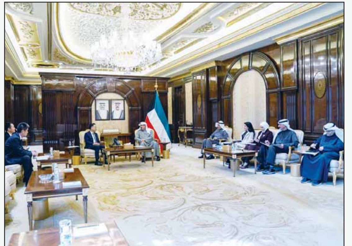
PM Diwan photo