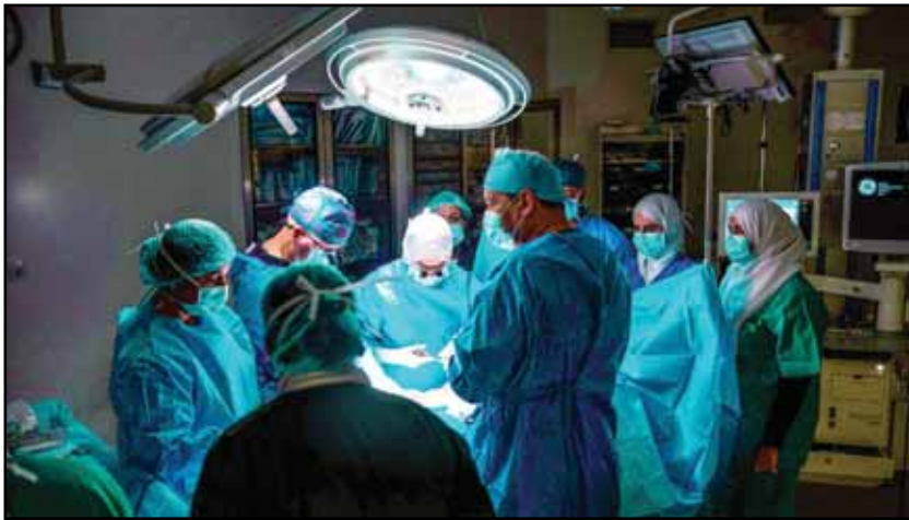
The solidarity of medical teams has gained medical achievements.