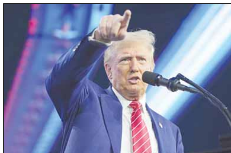
President-elect Donald Trump speaks at AmericaFest, on Dec. 22, 2024, in Phoenix.

Presidents historically have no involvement in dictating or recommending the punishments that federal prosecutors seek for defendants in criminal cases, though Trump has long sought more direct control over the Justice Department's operations. The president-elect wrote that he would direct the department to pursue the death penalty "as soon as I am inaugurated," but was