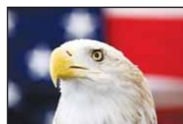
Uncle Sam, a 25-year-old bald eagle, sits on his perch in front of a US flag.

The bald eagle has appeared on the Great Seal of the United States, which