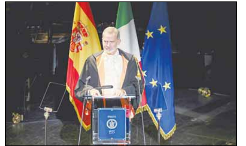
King of Spain, Felipe VI speaks during the ceremony for the awarding of the Honoris Causa Doctorate in Social Sciences and Statistics to His Majesty King Felipe VI of Spain, at the San Carlo theater in Naples, Italy, Thursday, Dec. 12, 2024.

Felipe said Spain needed to remain calm in the public sphere, even in the face of a "sometimes thunderous" contest in its politics.