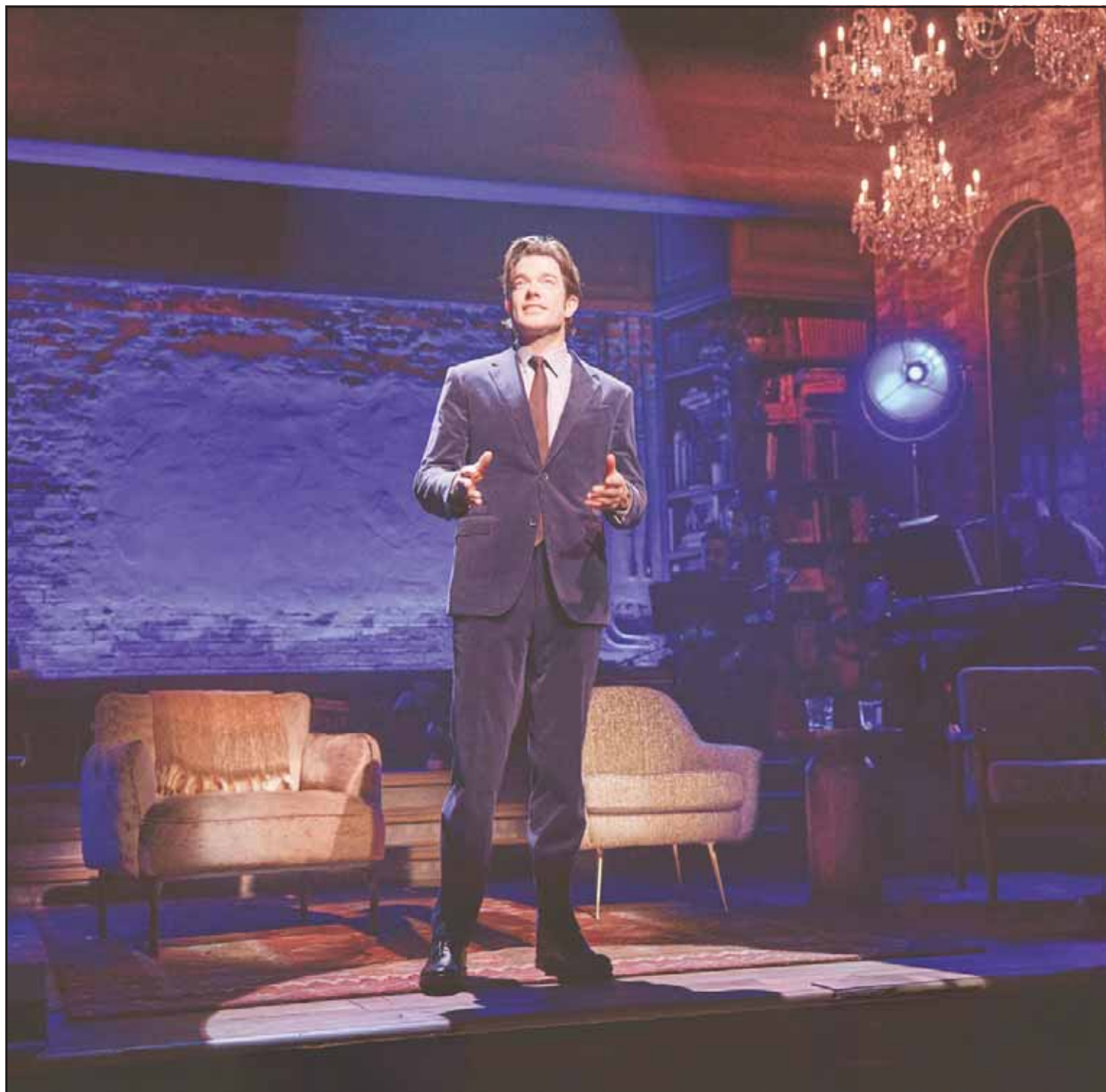
John Mulaney performing in 'All In: Comedy About Love' in New York.