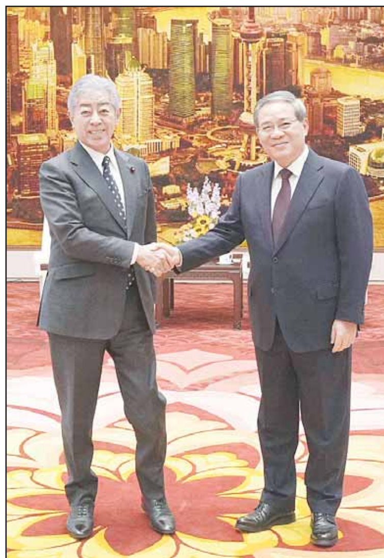
Japan's Foreign Minister Takeshi Iwaya, left, and Chinese Premier Li Qiang, right, shake hands at the Great Hall of the People in Beijing Wednesday, Dec. 25, 2024.

Iwaya told reporters before his departure Tuesday that he will also hold bilateral high-level people and cultural exchange talks, joined by the education ministers from the two sides.