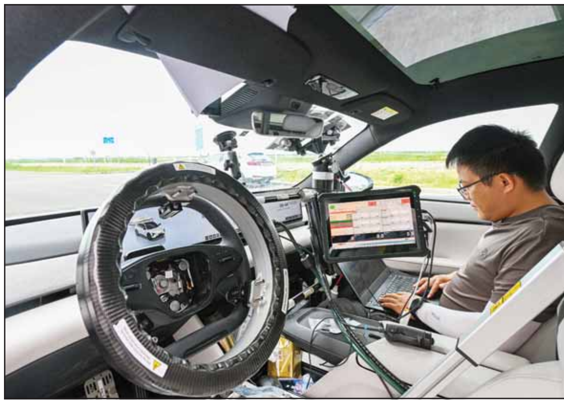
An intelligent connected vehicle tester works before a test at an enclosed test field in Tianjin, north China, June 14, 2024.