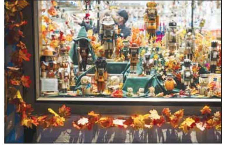
Nutcrackers are displayed outside the Leavenworth Nutcracker Museum on Wednesday, Nov. 27, 2024, in Leavenworth, Wash.