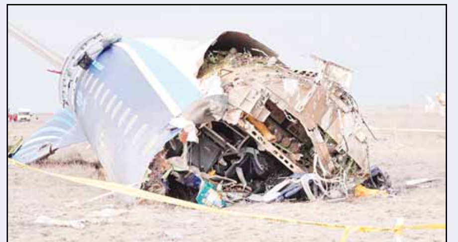
In this photo taken from a video released by the administration of Mangystau region, the wreckage of Azerbaijan Airlines Embraer 190 lies on the ground near the airport of Aktau, Kazakhstan, Wednesday, Dec. 25, 2024. (AP)

Regional N1 television reported dozens of vehicles were stuck in the snow for 10 hours in western Bosnia overnight before they could continue. (AP)