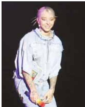
Puerto Rican singer Young Miko performs during the Coca-Cola Flow Fest in Mexico City on Nov 25, 2023.

"I think everything happens for a reason and evolution is a part of absolutely everything, so I'll just leave that there."