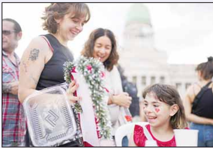
A girl with face paint looks at herself in a mirror during a Christmas event organized by the Excluded Workers Movement for those in need, outside Congress in Buenos Aires, Argentina, Dec. 24, 2024.