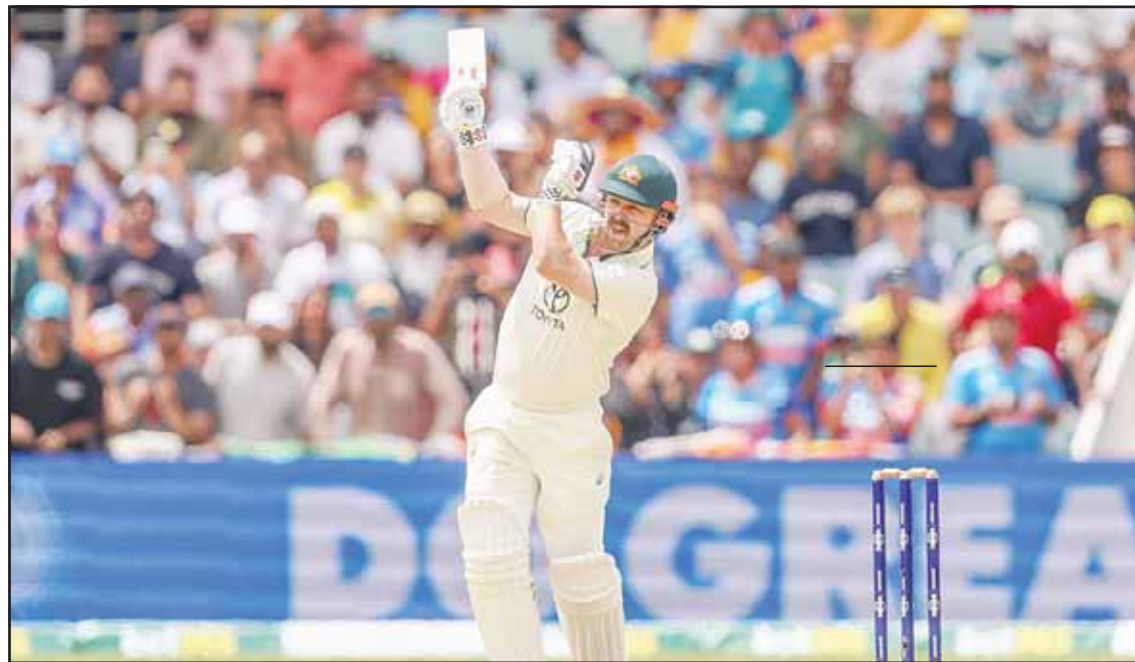
Australia's Travis Head plays a shot during play on day five of the third cricket test between India and Australia at the Gabba in Brisbane, Australia.

"The impact that he's had on the series so far is massive," Sharma said. "I hope he continues to do that because these (next) two games are very important for us. How he operates is very plain and simple. He has so much belief in his own skill set that there's not much discussion we need to have with him - it makes it easy for me."