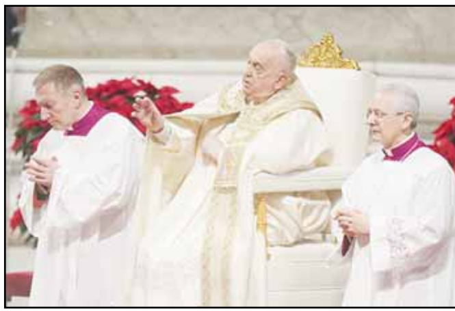
Pope Francis presides over the Christmas Eve Mass in St. Peter's Basilica at the Vatican, Tuesday, Dec. 24, 2024, after opening the basilica's holy door marking the start of the Catholic Jubilee year 2025.

"The Christmas story encourages us to consider the experiences and feelings of others," she said. "It also reflects our own vulnerabilities and reminds us of the importance of giving and receiving empathy, as well as just how much we need each other in spite of our differences."