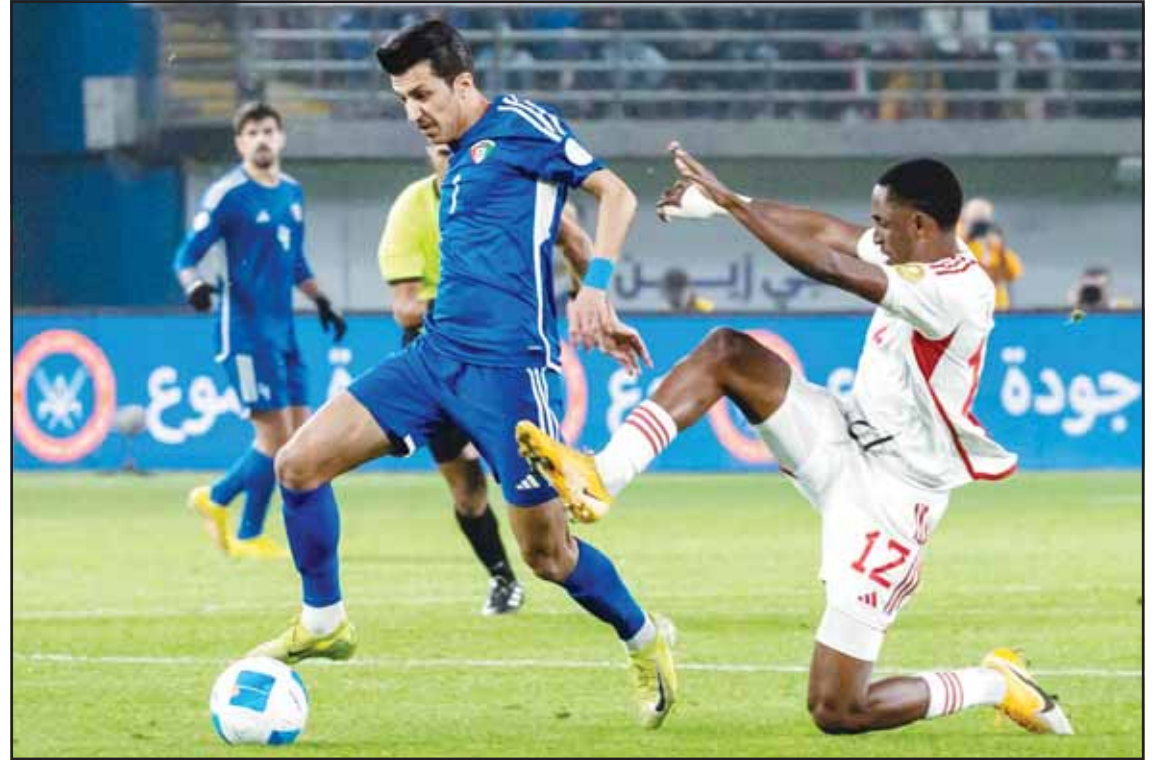
A Kuwait player dribbles past an opponent during Kuwait and UAE match.