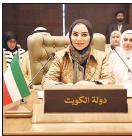
Kuwait's Minister of Social Affairs, Family and Childhood Affairs, Dr. Amthal Al-Huwaila

She revealed that in 2023, more than 49,915