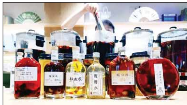
This photo taken on Dec. 2, 2023 shows herbal tea drinks at a tea shop in Kunming, capital of southwest China's Yunnan Province.