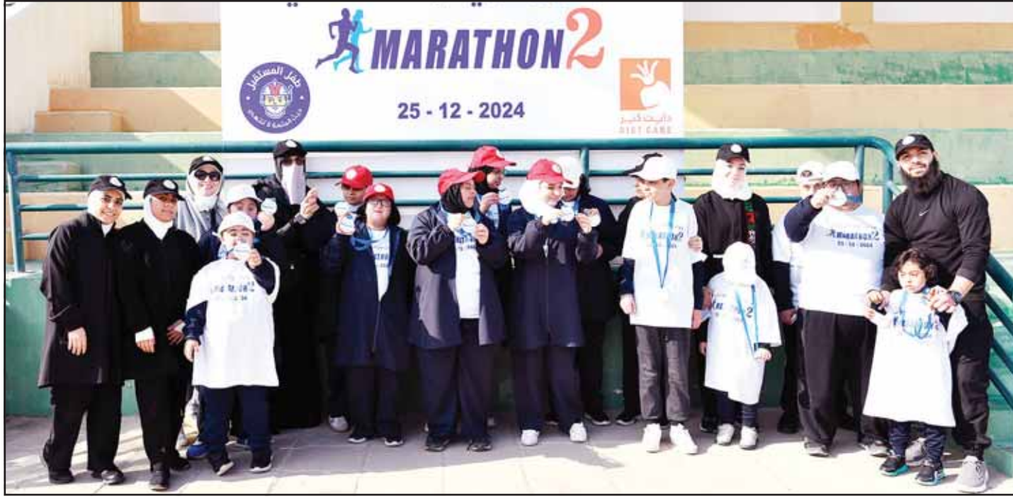
One of the entities participating in the marathon includes champion athletes, an administrative and technical staff.

Abdaly 21 08 Bubyan 21 09 Jahra 21 09 Failaka Island 21 11 Salmiyah 20 14 Ahmadi 23 08 Jal Aliyah 20 08 Nuwaisib 22 10