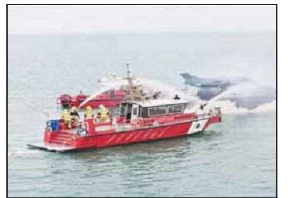
KFF boat extinguishes the fire on the yacht.

The authorities have registered a case of death due to suffocation, and an investigator has ordered the body to be referred to Forensics.