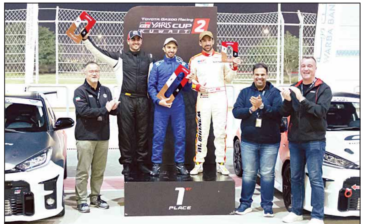
Top and above photos from the launch of ALSAYER & Toyota GR Yaris Cup season 2