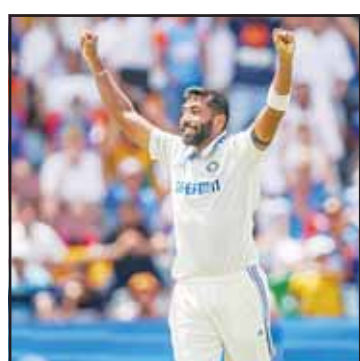
India's Jasprit Bumrah celebrates the wicket of Australia's Marnus Labuschagne during play on day five of the third cricket test between India and Australia at the Gabba in Brisbane, Australia.

In the Australian camp, run-maker Travis Head has been passed fit to play and will be joined by MCG hero