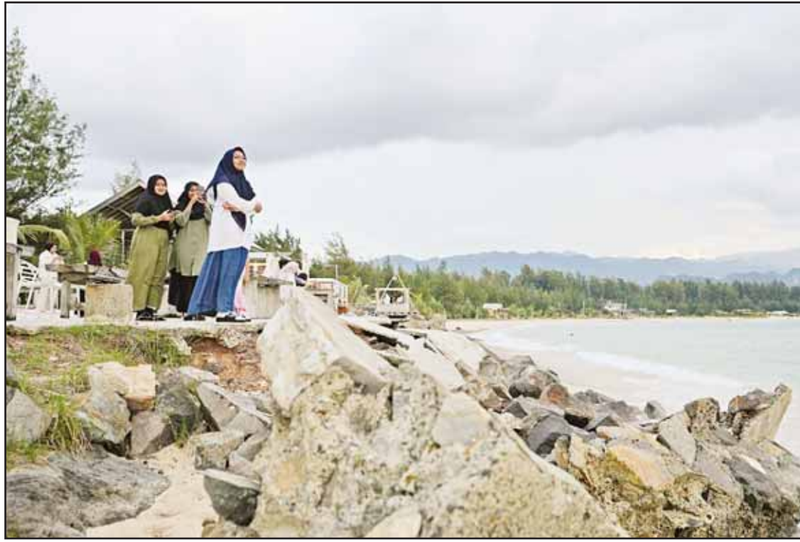
Young girls enjoy the view at Lampuuk beach, one of the areas hardest hit by Indian Ocean tsunami in 2004, on the outskirts of Banda Aceh, Indonesia, Friday, Dec. 13, 2024.

Infrastructure in Aceh has been rebuilt and is now stronger than before the tsunami. Early warning systems have been set up in areas closer to shores, to warn residents of a potential tsunami.