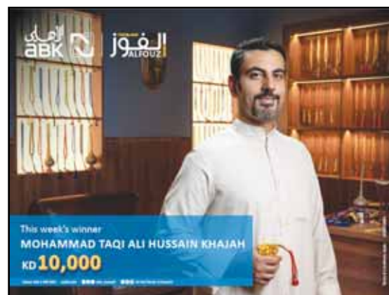
ABK Al Fouz winner

Open an Alfouz account today and enjoy increased opportunities to win the lifestyle you've been waiting for!