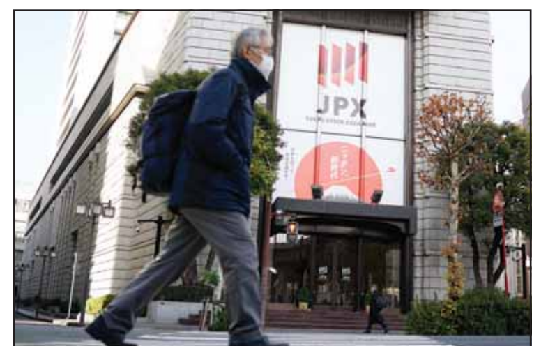
People walk in front of Tokyo Stock Exchange building Wednesday, Dec. 25, 2024, in Tokyo.

Meanwhile, the flight-tracking site FlightAware reported that 4,058 flights entering or leaving the U.S., or serving domestic destinations, were delayed, with 76 flights canceled. The site did not post any American Airlines flights on Tuesday morning, but it showed in the afternoon that 961 American flights were delayed.