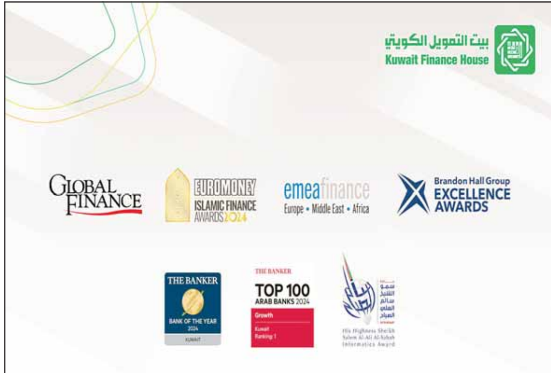
Most notable awards