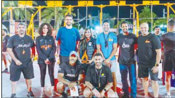
A group photo of the Burgan Bank and Flare Fitness teams