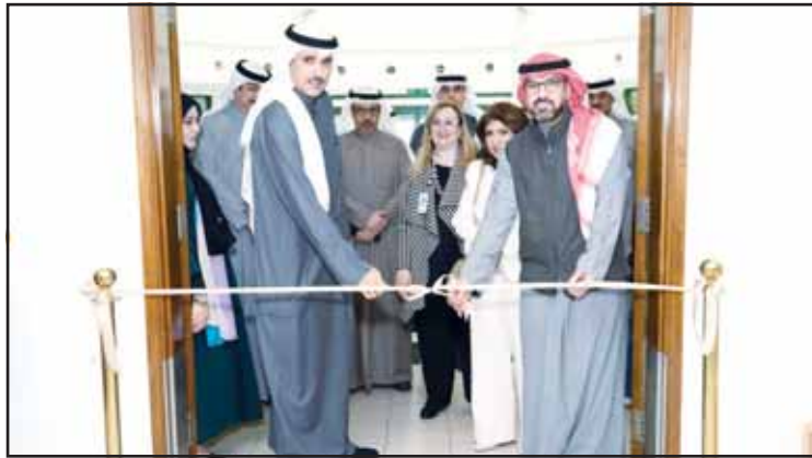
H.E. Sheikh Hamoud Jaber Al-Ahmad Al-Sabah, Governor of Al Ahmadi inaugurating the exhibition