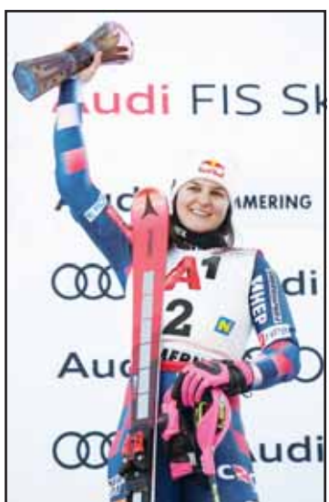
The winner Croatia's Zrinka Ljutic celebrates after an alpine ski, women's World Cup slalom race in Semmering, Austria.

Fredrik Moeller of Norway claimed his first World Cup victory by winning a super-G that got off to an inauspicious start on Sunday as Gino Caviezel became the third skier this weekend to be airlifted off the slope set to be used for the 2026 Olympics. After Alexis Monney's debut