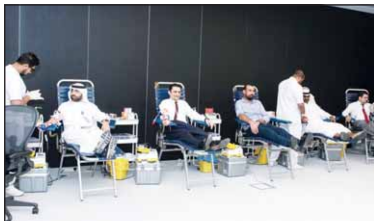
Burgan employees donating blood as part of this year's campaign