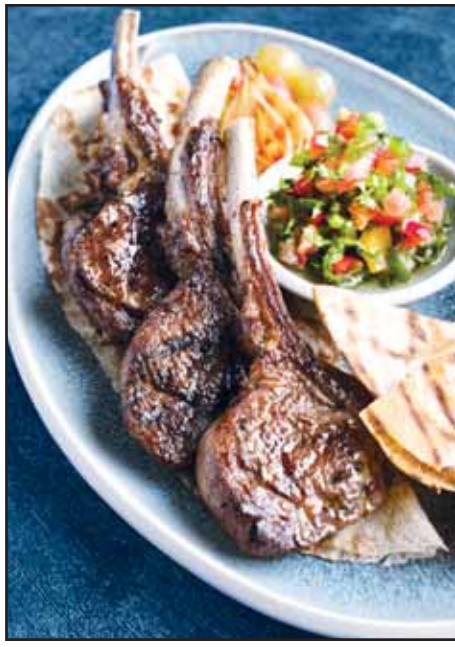
Li Beirut opens at Four Seasons Hotel Kuwait, bringing authentic Lebanese cuisine and culture to Kuwait.