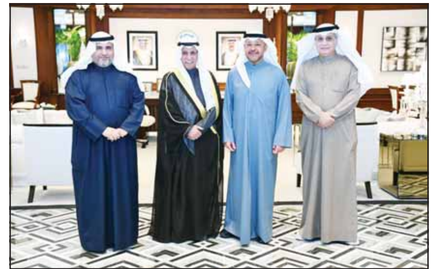
Farwaniya Governor photo Farwaniya Governor receives Kuwaiti citizens in his office at Farwaniya Governorate.