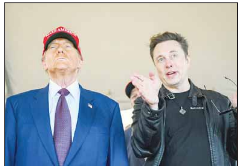
President-elect Donald Trump listens to Elon Musk as he arrives to watch SpaceX's mega rocket Starship lift off for a test flight from Starbase in Boca Chica, Texas, Nov. 19, 2024.

"I have many H-1B visas on my properties. I've been a believer in H-1B. I have used it many times. It's a great program," Trump told the newspaper.