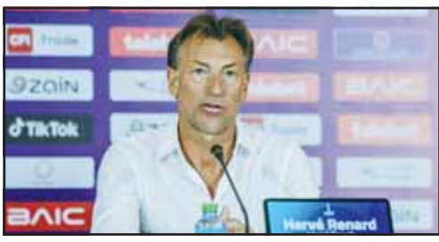
Head coach speaks to reporters following Saudi Arabia decisive victory over Iraq.