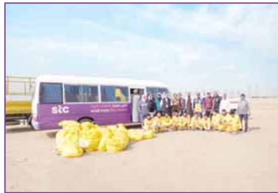
Group photo of participants in stc environmental cleaning campaign.