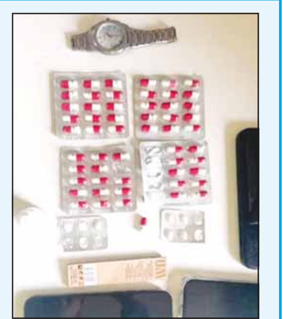
Drug pills and other items seized by the Jahra traffic patrol.

The tragic events underscore the need for robust measures to address disputes and improve the treatment of domestic workers to prevent such horrifying outcomes.