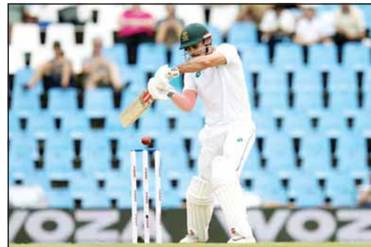
South Africa's David Bedingham plays a shot during day four of the Test cricket match between South Africa and Pakistan, at the Centurion Park in Centurion, South Africa.

The second test begins at Cape Town on Friday.