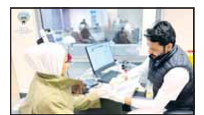
Blood donation campaign

The event saw active participation from the Authority's employees, who emphasized community solidarity and the promotion of blood donation. The campaign concluded with