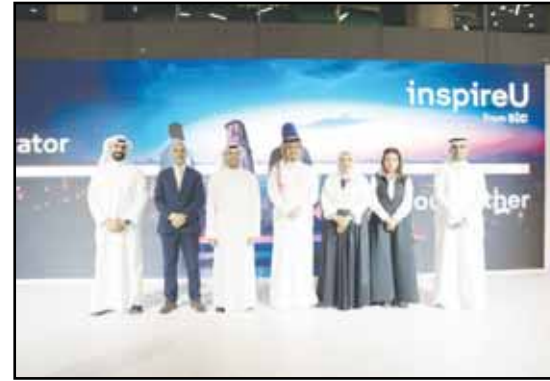
The company's executive management with the winners of the inspireU Kuwait program participating in the graduation ceremony.