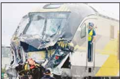
A damaged Brightline train is seen after it collided with a fire truck in downtown Delray Beach, Fla., on Dec. 28, 2024. (AP)

Sixty volunteer search-and-rescue personnel helped in the three-day search, including canine, drone and ground teams. The Coast Guard used infrared technology to search from the air. (AP)