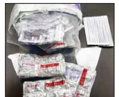
Customs officers display a significant seizure of 1,200 Tramadol pills and 210 grams of marijuana, intercepted during an attempt to smuggle drugs into Kuwait.