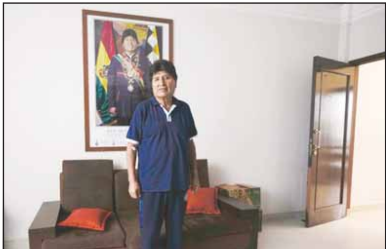
Former President Evo Morales gives an interview in Lauca N in the Chapare region of Bolivia, Nov. 21, 2024.

Here, the former coca farmer and fiery union leader - long considered one of the last of the so-called "pink wave" of leftist leaders who once dominated Latin American politics - is planning his comeback.