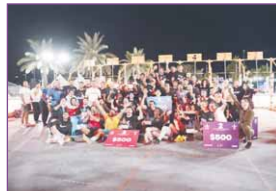
Group photo of all winners and organizers.