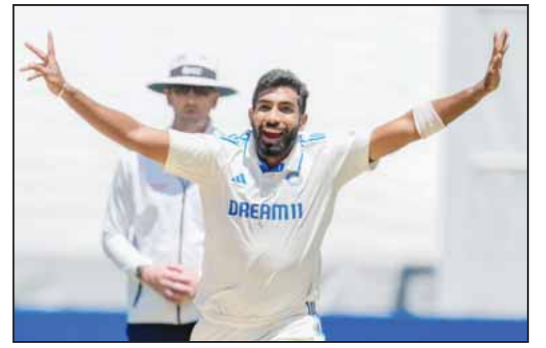
India's Jasprit Bumrah celebrates the wicket of Australia's Mitchell Marsh during play on day four of the fourth cricket test between Australia and India at the Melbourne Cricket Ground, Melbourne, Australia.

"We can see later on the fourth day the pitch was doing a little bit