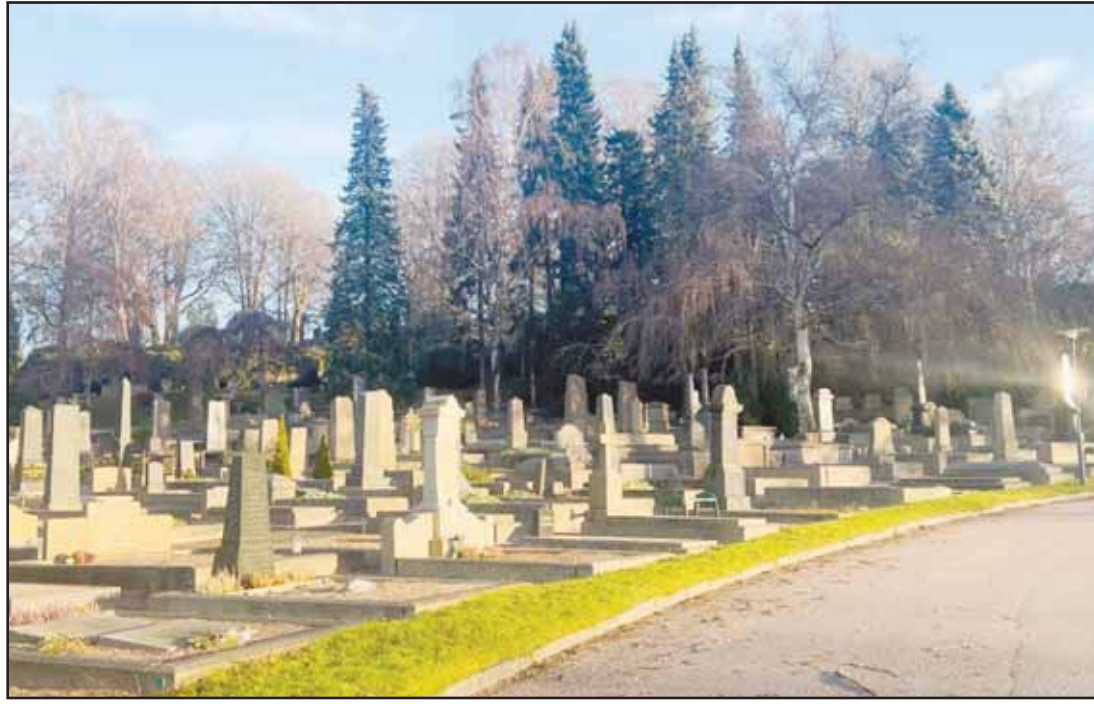
A view of graves at Östra Kyrkogården, one of the largest cemeteries in Gothenburg, on Dec. 20, 2024 in Gothenburg, Sweden.

"The (recommendations) mean that we need more land for burial grounds and this is a phenomenon in the big cities, and a problem in the big cities, where land resources are scarce to begin with and not always sufficient to meet burial ground needs even in times of calm and peace," said Katarina Evenseth,