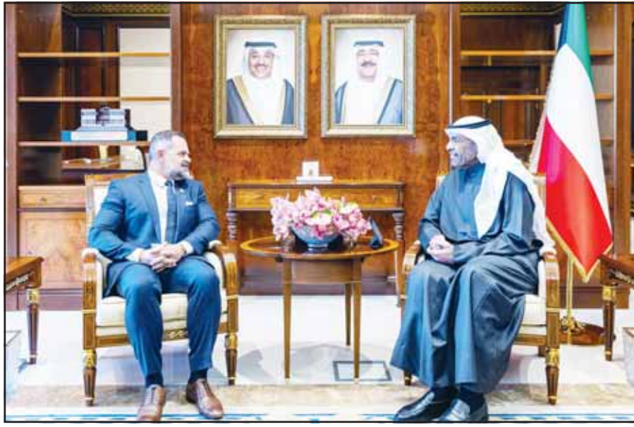
The Minister of Foreign Affairs receives a member of the Foreign Affairs Committee in the House of Representatives of the United States of America.