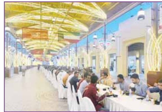
The largest Iftar table in Mubarakiya to serve more than 3,000 fasting people.