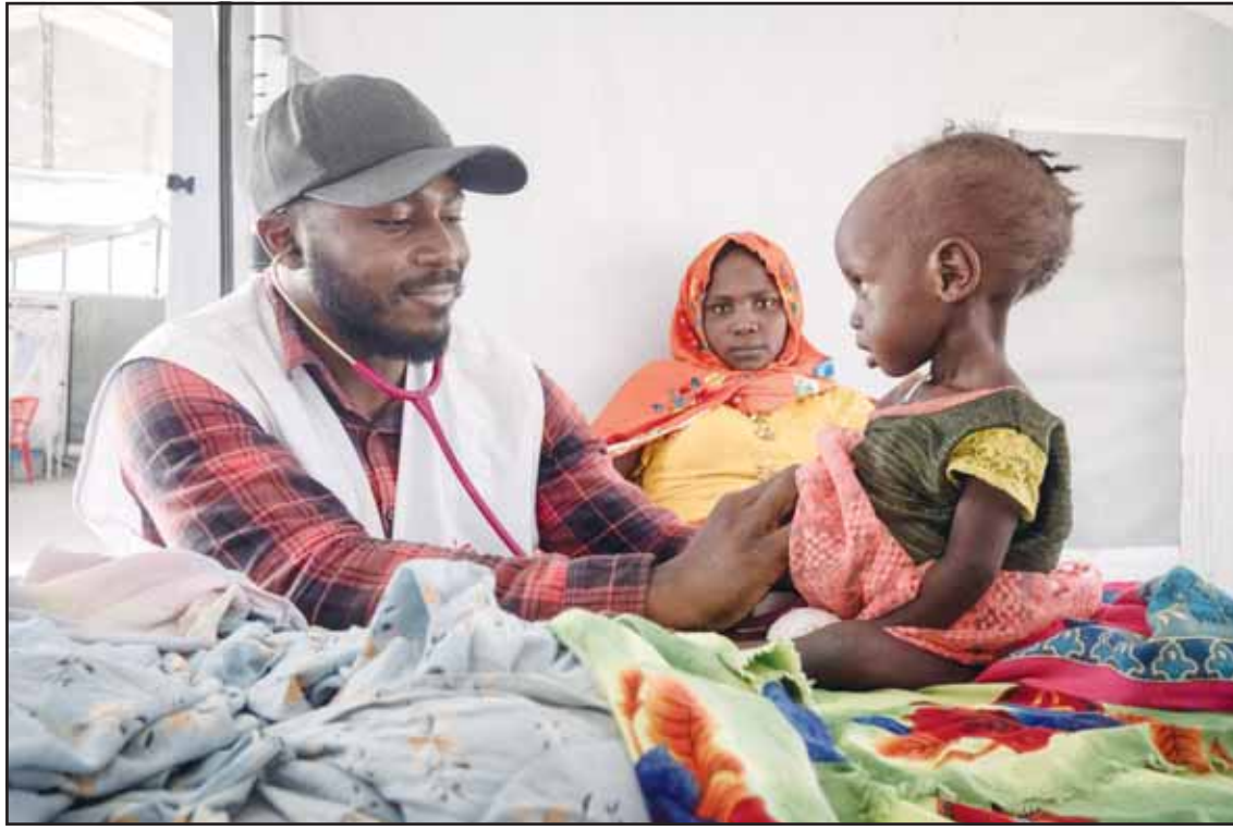
A doctor treats a Sudanese child suffering from malnutrition at an MSF clinic in Metche Camp, Chad, near the Sudanese border, on April 6, 2024.

under siege by the RSF, enduring relentless shelling and airstrikes from both the paramilitary group and the army. These attacks have frequently targeted densely populated areas, including camps housing displaced civilians.