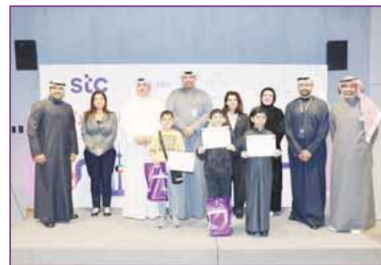
Group photo of the winners at the closing ceremony of the competition.