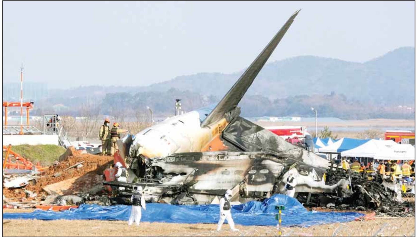
Firefighters and rescue team members work near the wreckage of a passenger plane at Muan International Airport in Muan, South Korea, Sunday, Dec. 29, 2024.

179 dead, 2 miraculously survive fiery wreckage