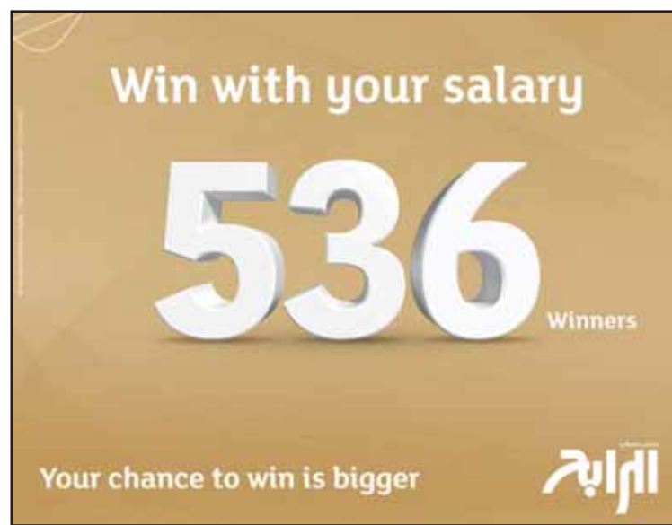
The campaign visual

With world-class dining, state-of-the-art amenities, and an unwavering commitment to excellence, it continues to redefine hospitality in Kuwait.