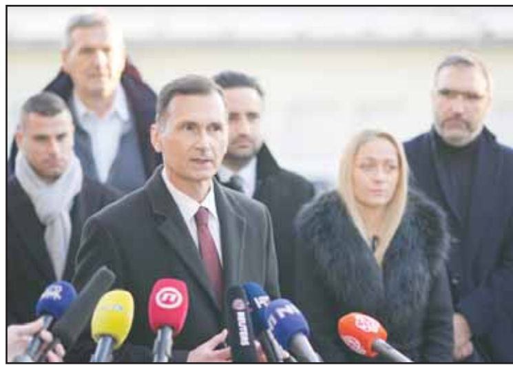
Dragan Primorac, the candidate of the ruling Croatian Democratic Union (HDZ) speaks to the media after casting his ballot during a presidential election at a polling station in Zagreb, Croatia, Sunday, Dec. 29, 2024.

Though the presidency is largely ceremonial in Croatia, an elected