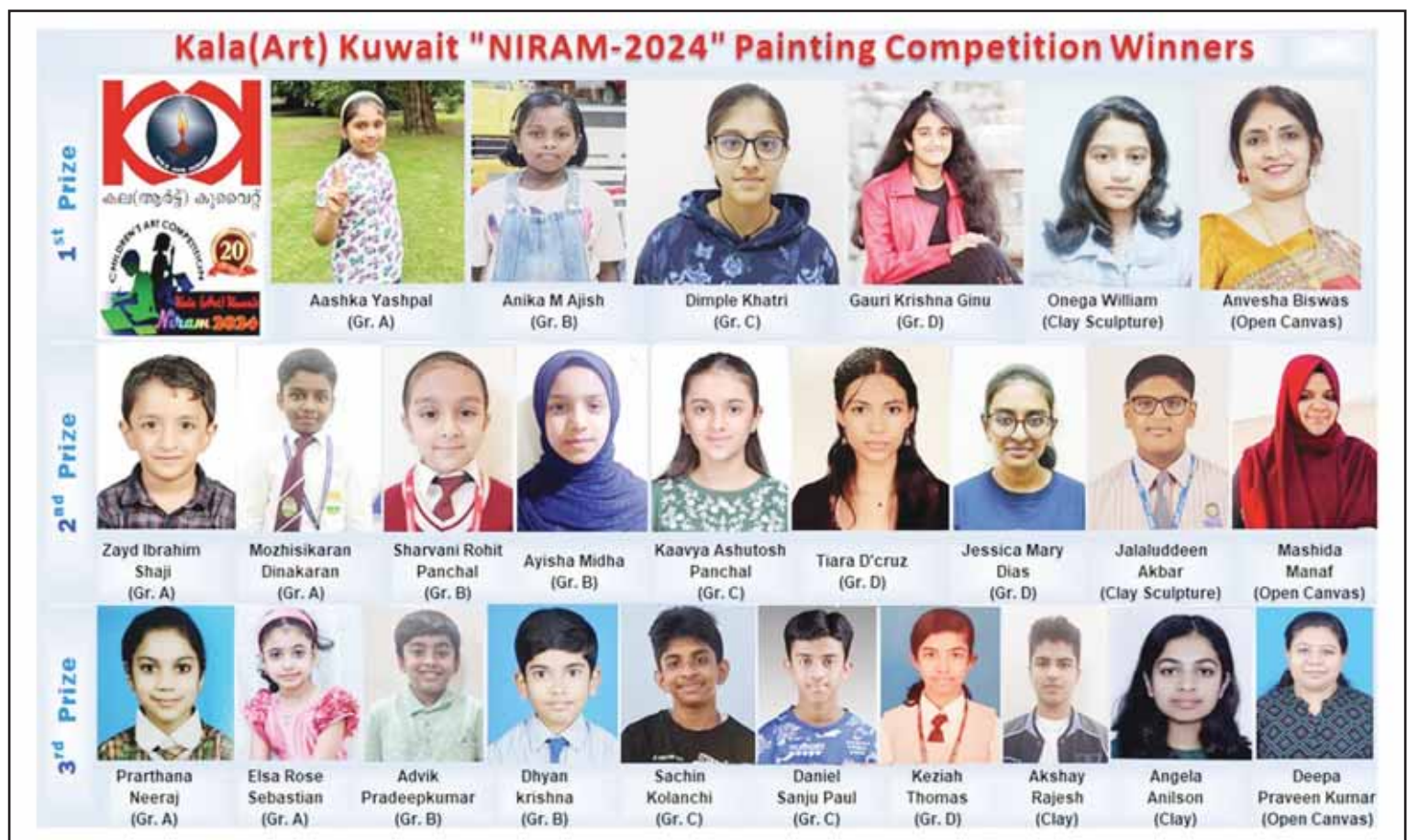
Niram 2024 Children's Day painting competition winners