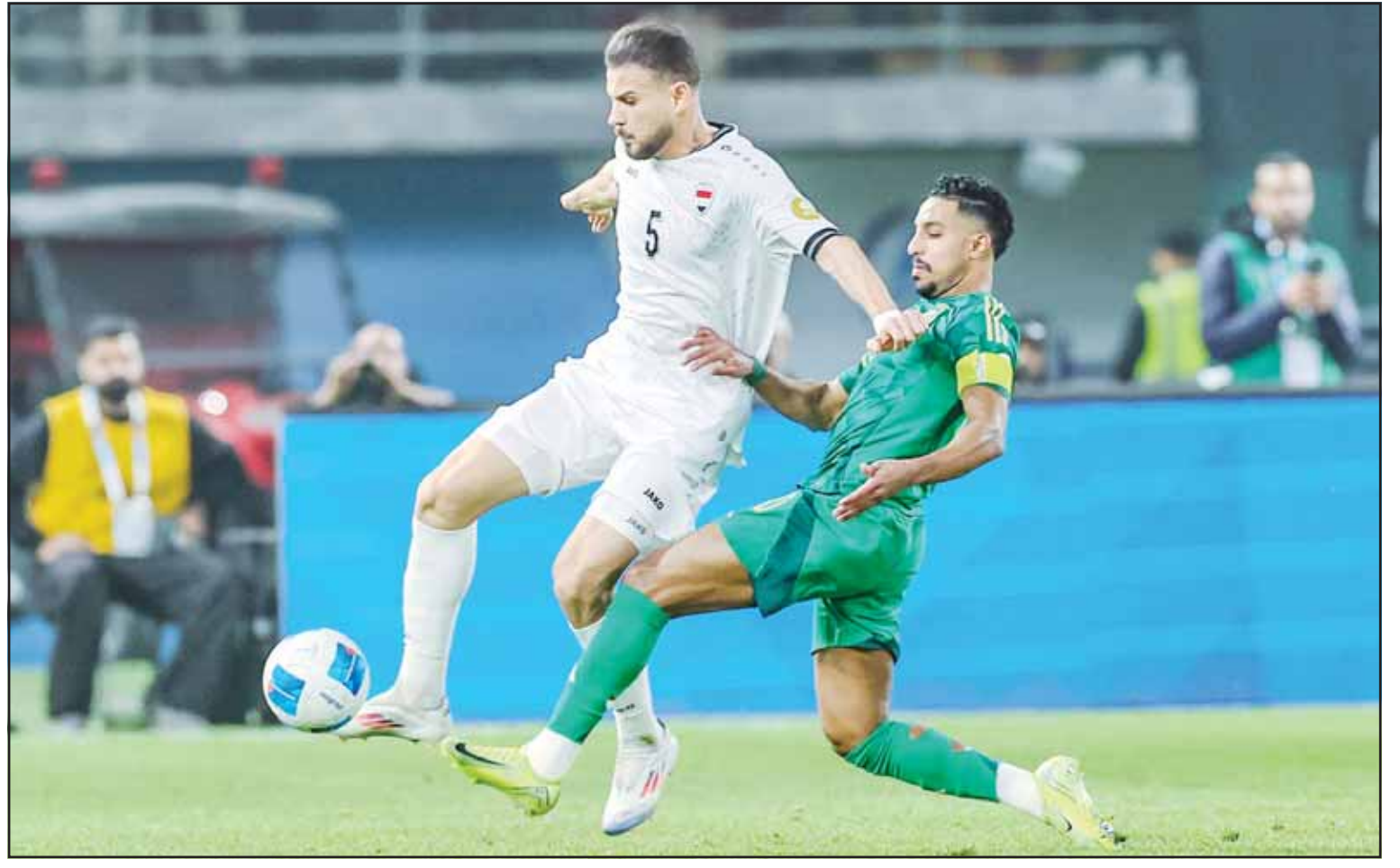
Saudi Arabia skipper vies for the ball with Iraqi player during the finale Group B match in Kuwait.

As the “Khaleeji Zain 26” progresses, all eyes are on the semi-finals as teams battle for a place in the coveted final match.