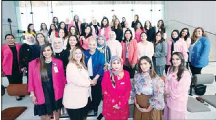
Breast Cancer awareness October 2024