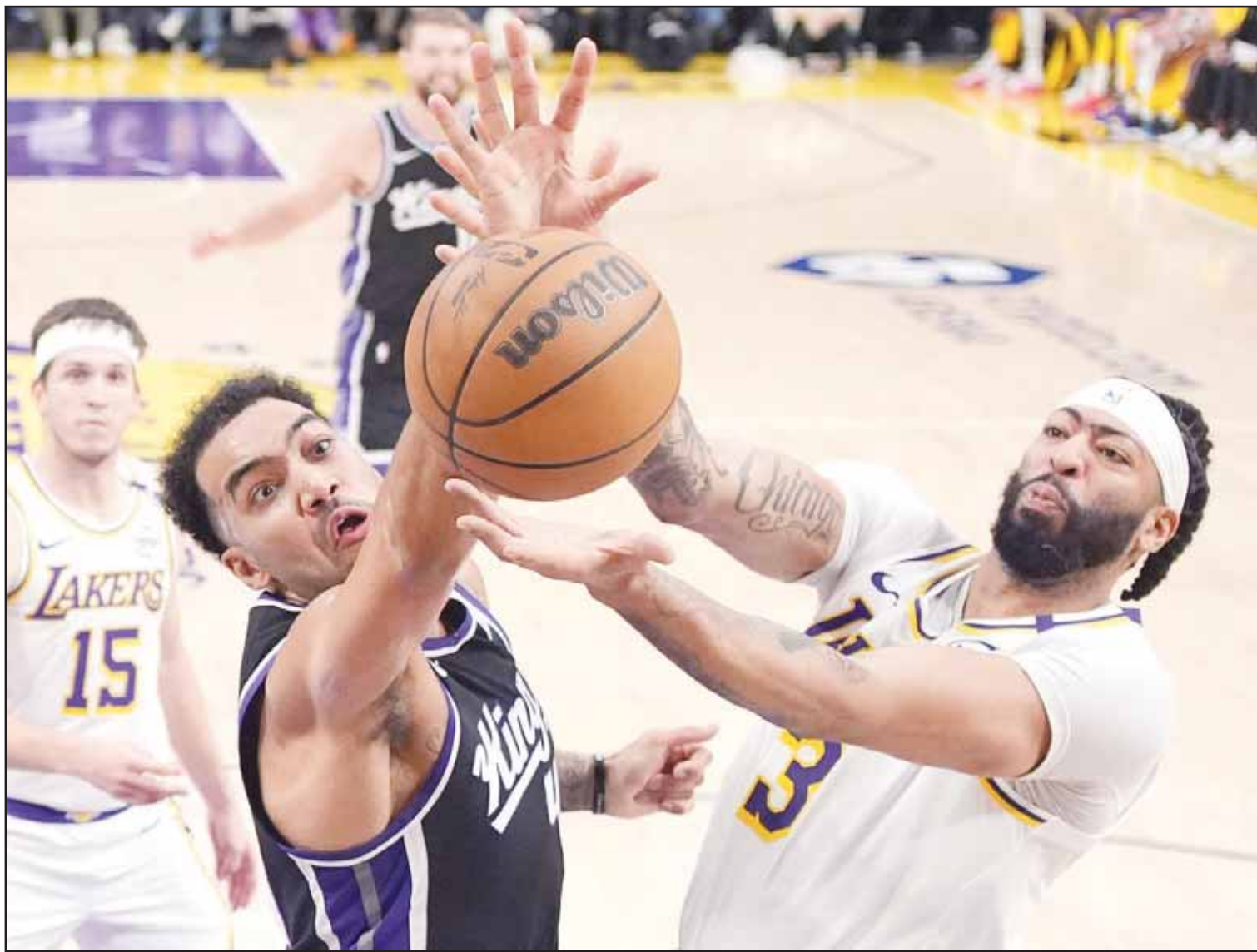
Sacramento Kings forward Trey Lyles (41) and Los Angeles Lakers forward Anthony Davis (3) grapple for a rebound during the first half of an NBA basketball game in Los Angeles.

The five-match series is level at 1-1. The fifth and final Australia-India test is scheduled to start on Jan. 3 at the Sydney Cricket Ground.