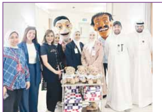
stc ambassadors and public relations team are present to participate in the event.