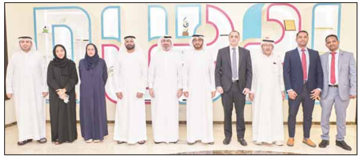
Al Ahli Bank of Kuwait and Dubai Land Department officials during the announcement of the agreement.

KUWAIT CITY, Dec 29: The Real Estate Regulatory Agency (RERA), the regulatory arm of Dubai Land Department (DLD), has appointed Al Ahli Bank of Kuwait (ABK-UAE) as an escrow account trustee, making it the first Kuwaiti Gulf bank to offer this service to customers in the UAE.