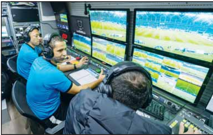
VAR referees follow up on the matches.

While VAR has been praised for enhancing fairness and precision, it has also sparked debate, with some fans and players arguing that it disrupts the flow of the game. VAR made its debut in the Gulf Cup during the 24th edition, hosted by Qatar in 2019.