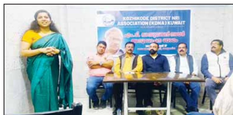
A photo from the event.

The Indian Muslim Association Youth Wing invites all eligible students to seize this remarkable opportunity to showcase their knowledge, engage in meaningful learning, and compete for extraordinary prizes.