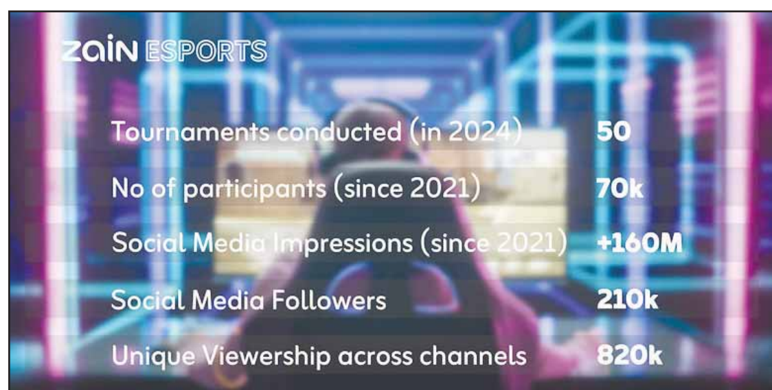
Zain Esports 2024 growth

Kuwait: Zain Esports conducted multiple offline FC (football) tournaments in Kuwait through-