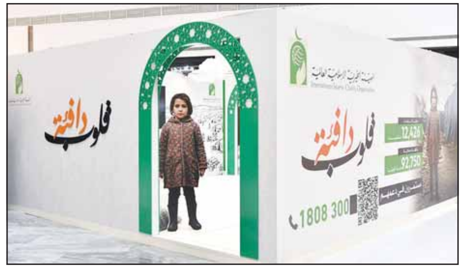
The International Islamic Charitable Organization organizes its winter campaign 'Warm Hearts'.