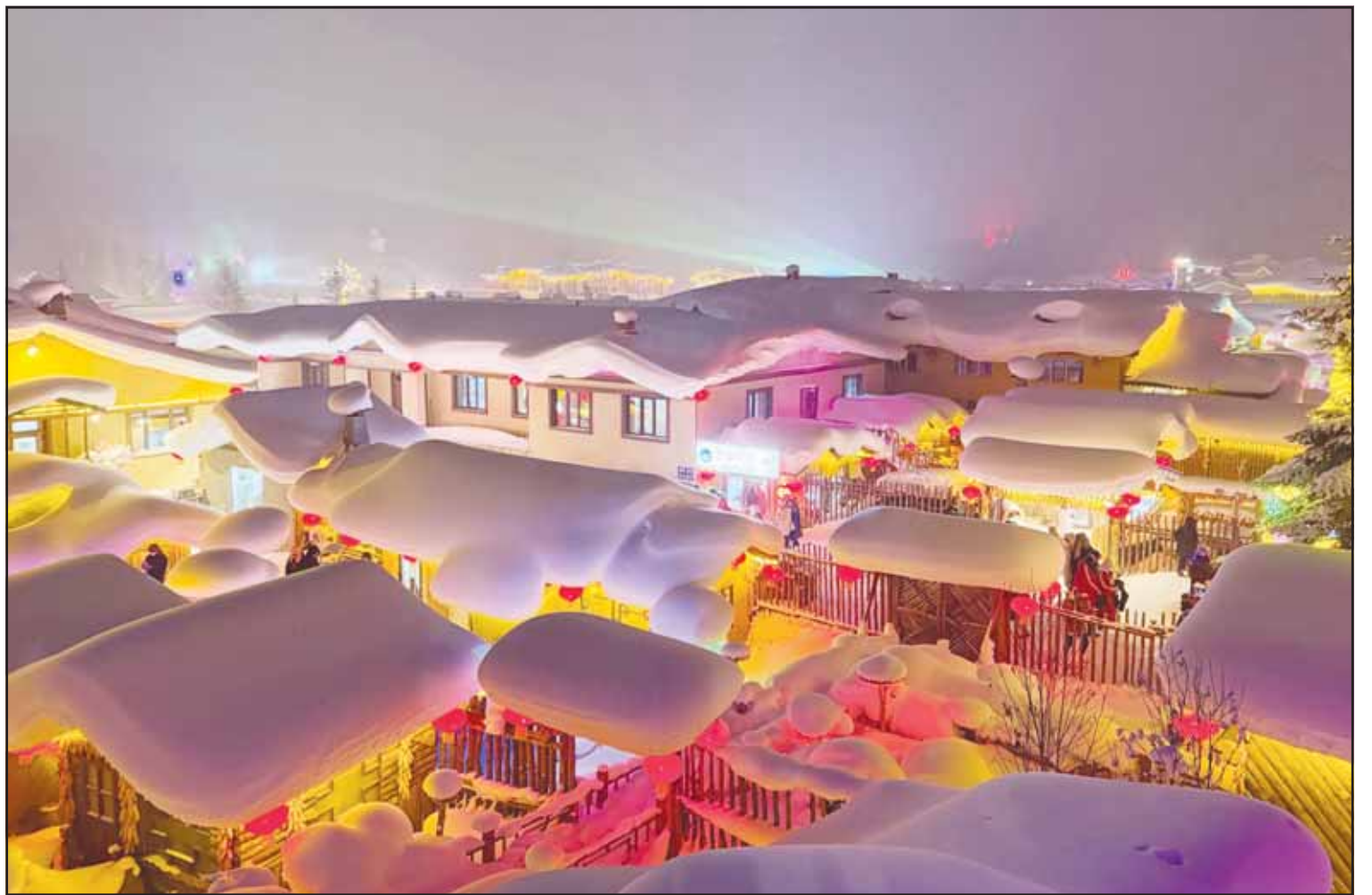
This photo taken on Dec. 28, 2024 shows night view of a snow town scenic area in Hailin City, northeast China's Heilongjiang Province. The scenic area has seen a peak in tourism recently with the average number of daily visitors exceeding 20,000.

Coca farmers drying their leaves proudly recount how Morales kicked out U.S. anti-drug agents almost in the same breath as they extoll the benefits of the coca plant, cherished by Indigenous communities and maligned by the West as the raw material for cocaine.