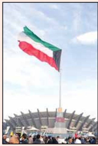
The Kuwait national flag is hoisted above the Jaber International Stadium.

The semi-final matches are set for Tuesday, with Oman facing Saudi Arabia at 17:30 pm., followed by Kuwait's match against Bahrain at 20:45 pm.