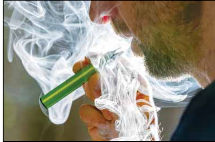
A man vapes on a disposable electronic cigarette in Brussels on Dec. 12, 2024, ahead of Belgium's ban on the sale of disposable vapes as of Jan. 1, 2025.