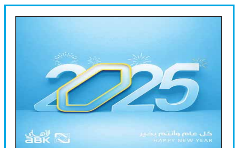
New Year greeting