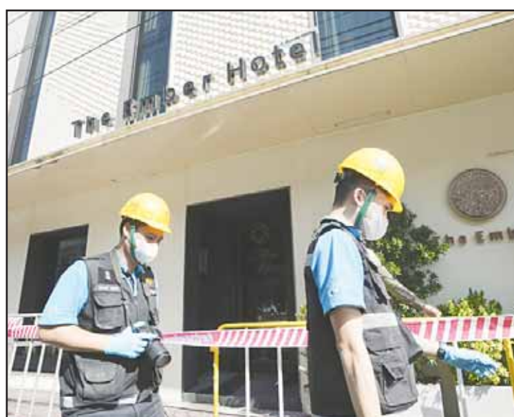
Police forensics team arrive at a hotel in Bangkok, Thailand, Monday, Dec. 30, 2024 after a fire.

banned from, as a "charade" and a ploy for Deby to remain in power to continue a "dynasty."