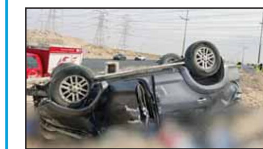
The victim's car turns turtle after the accident.