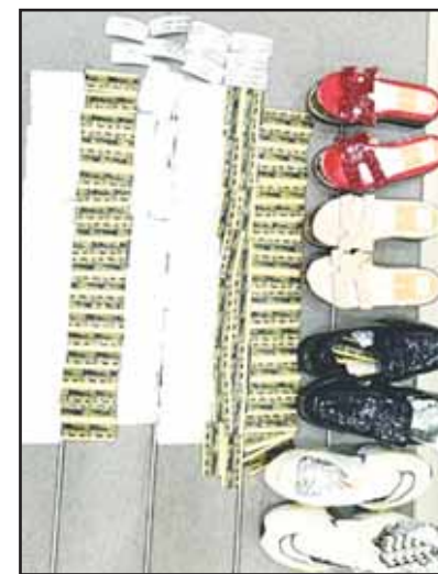
Drug pills found hidden in shoes.

All confiscated materials and arrested suspects have been referred to the appropriate authorities for further investigation and legal action.