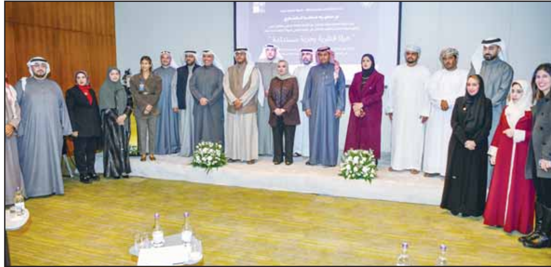
A number of officials in the General Authority and the General Secretariat of the Cooperation Council for the Arab States of the Gulf during their participation and confirmation of interest in wildlife.