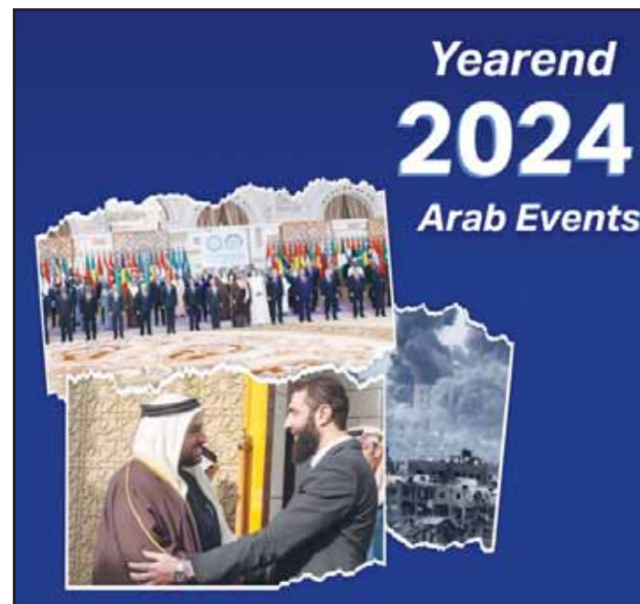
Some of the events which took place in the year 2024 in the Arab world.

The Israeli occupation's parliament, Knesset, passed a bill on October 28 which banned the UN Palestinian refugees agency (UNRWA), and informed the UN of the cancellation of a 1967 agree-