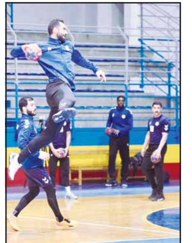
Players preparing for the World Cup.