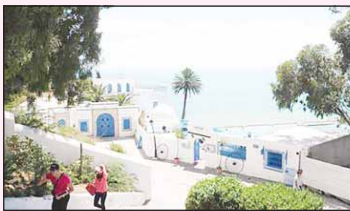
A view from the Palace of Zahra overlooking the tourist city of Sidi Bou Said.