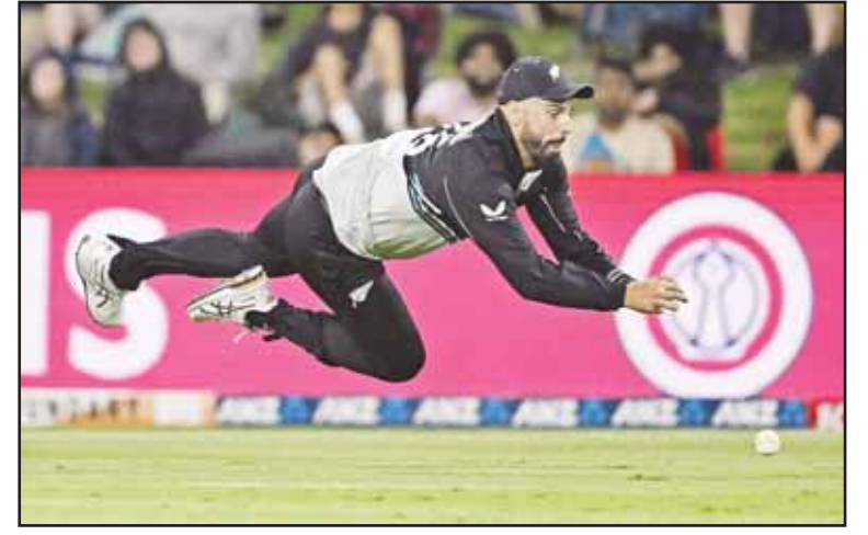
New Zealand's Daryl Mitchell attempts to make a catch, during the second Twenty20 international cricket match between New Zealand and Sri Lanka at Mt. Maunganui, New Zealand.

"It was good to contribute to a good score, one we were pretty happy with and to contribute to a win," Hay said.