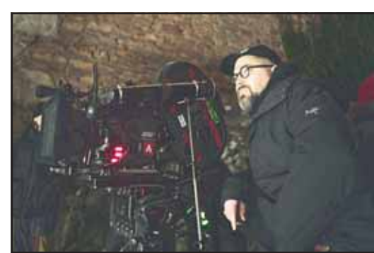
This image released by Focus Features shows director Robert Eggers on the set of 'Nosferatu.'

Eggers: It takes time to build trust for sure. But that instinct for me actually was really that first meeting. I was kind of blown away that one of my heroes wanted to meet with me. But then the con-