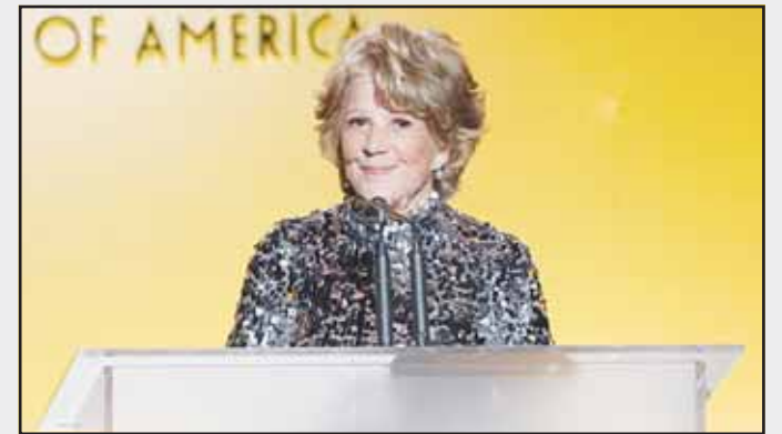
Linda Lavin speaks at the 33rd annual Producers Guild Awards, March 19, 2022, at the Fairmont Century Plaza Hotel in Los Angeles.