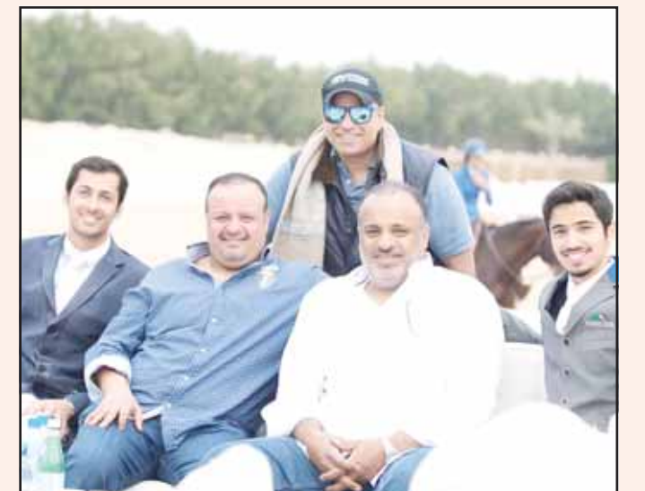
Organizers with some of the riders.