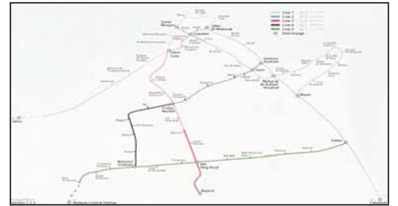
The Metro route

The decision approved the allocation of routes for transportation systems, including heavy and light trains, trams and buses. The project was later transferred from the Ministry of Communications to the Public Authority for Roads and Land Transport (PART) following its es-