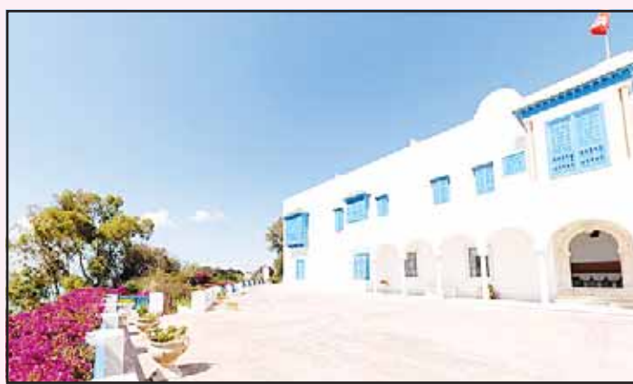
The palace's backyard overlooks the Mediterranean Sea.