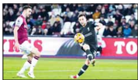
Liverpool's Diogo Jota shoots to score his side's fifth goal during the English Premier League soccer match between West Ham United and Liverpool at the London Stadium in London. Liverpool won 5-0.