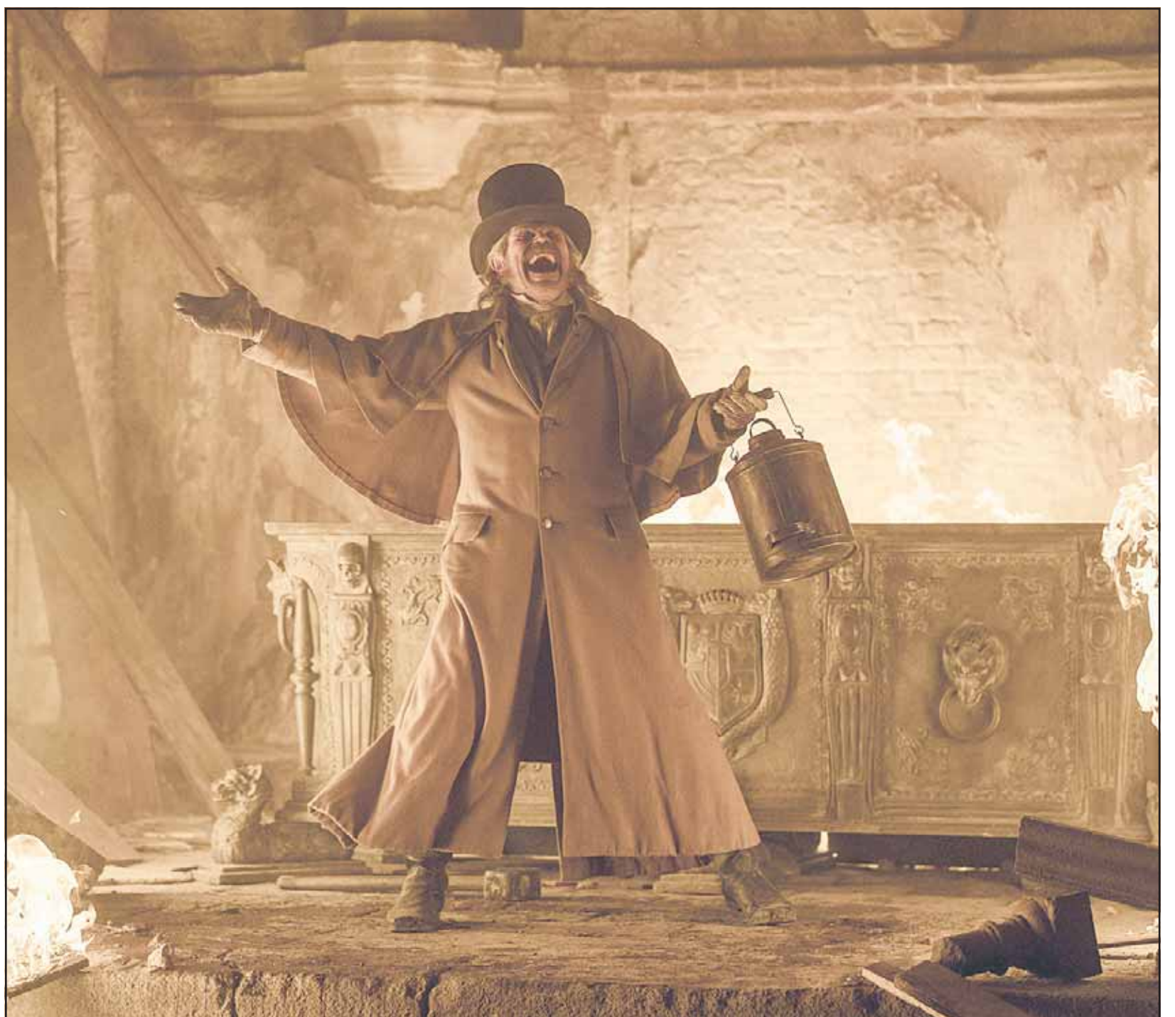
This image released by Focus Features shows Willem Dafoe in a scene from 'Nosferatu.'