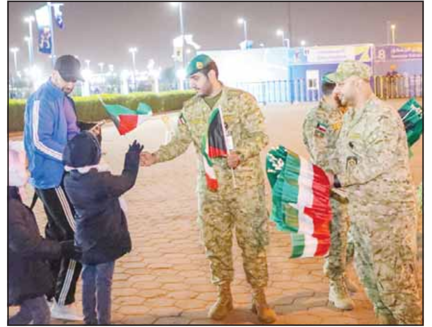
National Guards giving out the Kuwait flags to children at the stadium.