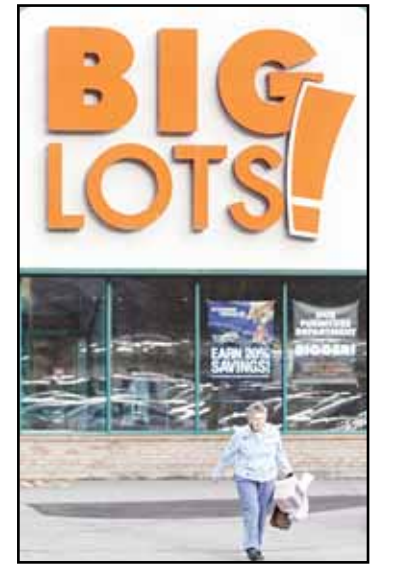
A shopper leaves the Big Lots store on Dec. 4, 2012 in Berlin, Vt.

Columbus, Ohio-based Big Lots sells furniture, home decor and other items. When it filed for bankruptcy in September, it said inflation and high interest rates caused consumers to pull back on their purchases of home and seasonal products, two categories the