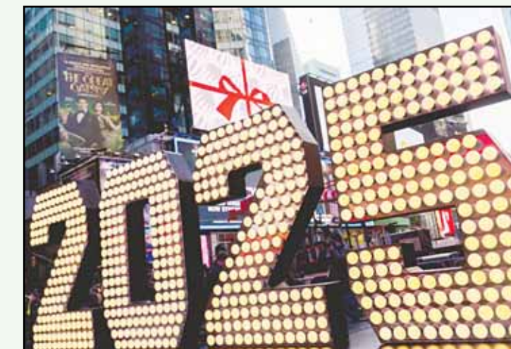
The 2025 New Year's Eve numerals are displayed in Times Square, on Dec. 18, 2024, in New York.

To adjust your approach, Lapato recommends viewing money goals as an opportunity to imagine your desired lifestyle in the future. She recommends asking questions like, "What