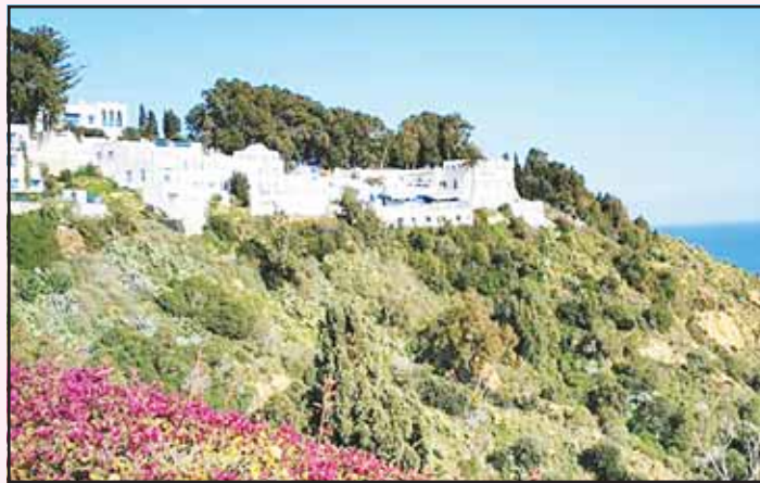
The Palace of Zahra Star.

The palace is home to some 2,200 rare artifacts and manuscripts. In 1991, it was turned into a concert hall for Arabic, Andalusian and Mediterranean music. (KUNA)