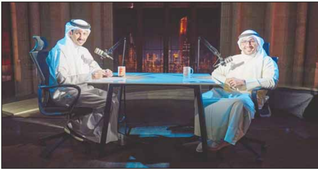
Photo taken during the interview.