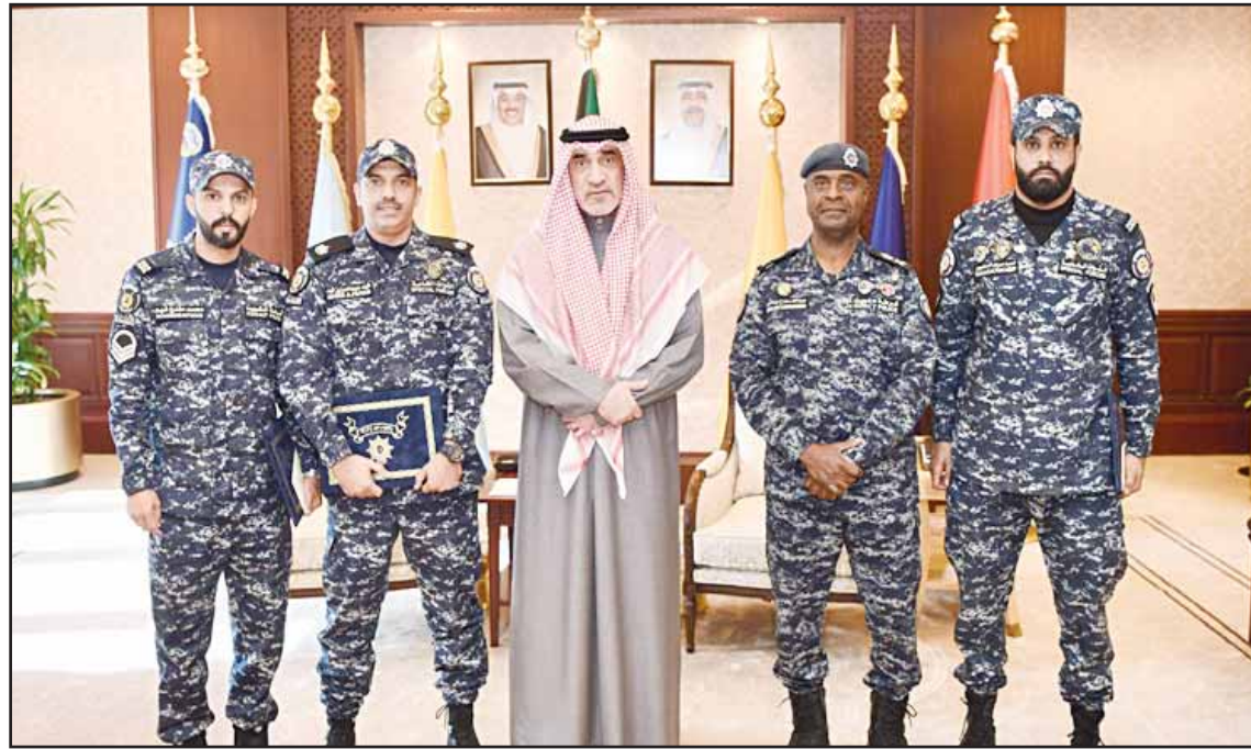
First Deputy Prime Minister, Minister of Defense and Minister of Interior Sheikh Fahad Yousef Saud Al-Sabah honors officers from the Special Security Forces for their efforts to maintain security during the football matches at the Jaber Stadium.