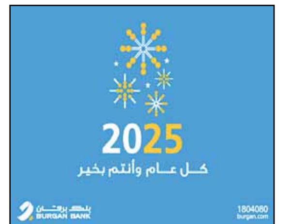
Burgan Bank wishes Kuwait a Happy New Year.

Burgan Bank would like to take this opportunity to extend its warmest wishes and heartfelt greetings to everyone in Kuwait for a joyous and prosperous New Year.