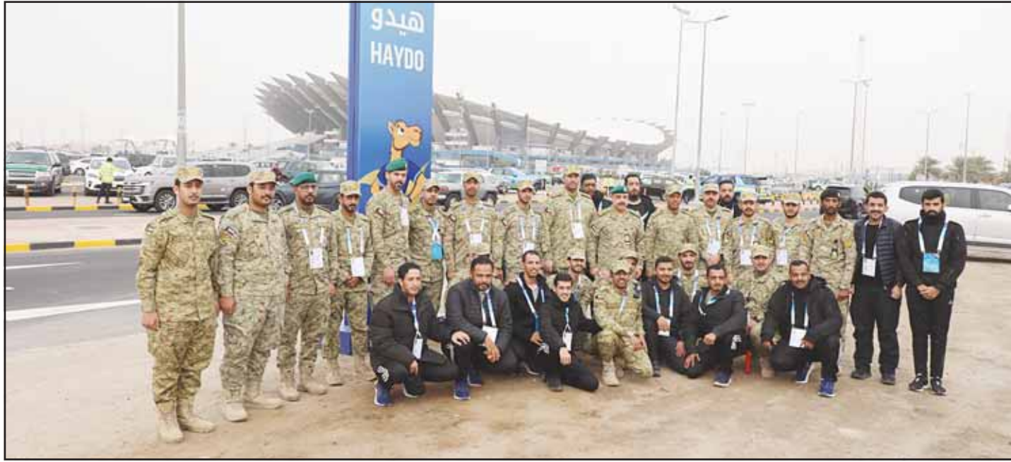
National Guards and volunteers heading for duty at the Jaber Stadium.