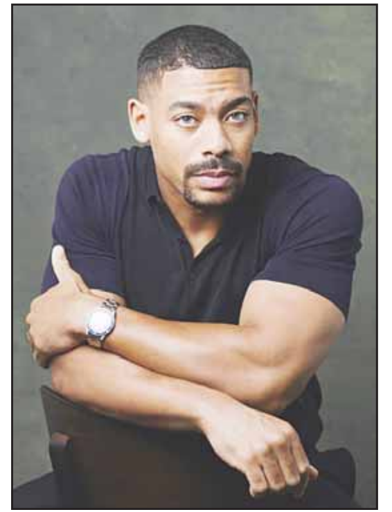
Aaron Pierre poses for a portrait on Aug. 29, 2024, in Los Angeles. Pierre has been named one of The Associated Press' Breakthrough Entertainers of 2024.

Indeed, when asked about his aspirations for future creative collaborators, the first name out of Pierre's mouth might surprise: "Women Talking" writer-director Sarah Polley.