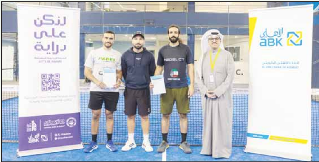
Padel tournaments throughout the year.