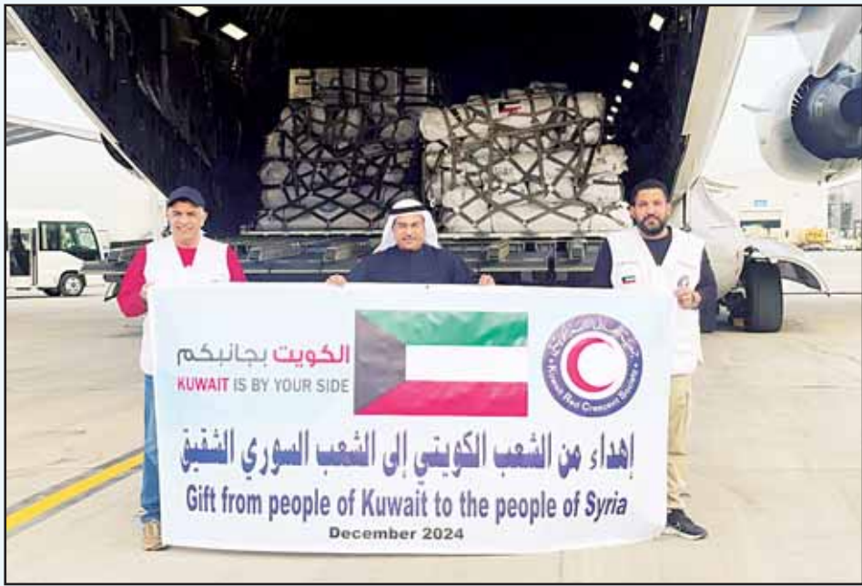
A moment captured before Kuwait's inaugural airlift flight departs, loaded with essential food supplies and tents bound for Syria.