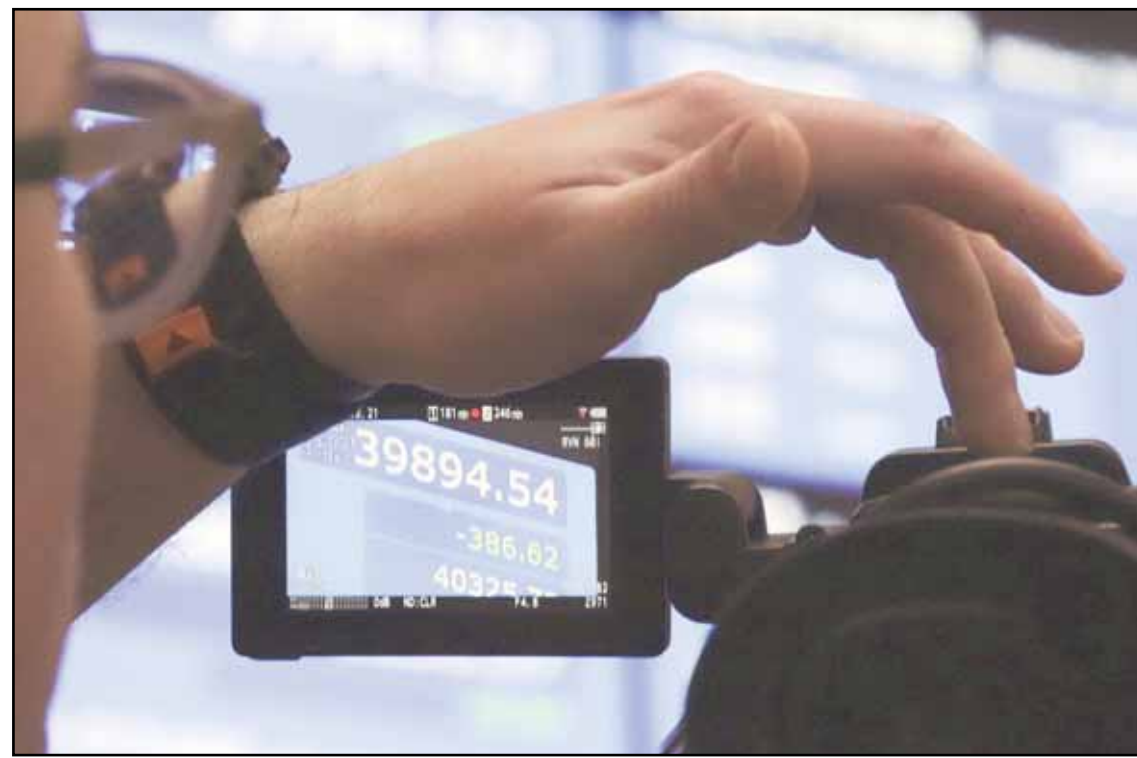
Nikkei 225 index is seen on screen as a TV camera crew films the site of a ceremony to mark the last trading day of the year at the Tokyo Stock Exchange Monday, Dec. 30, 2024, in Tokyo.

On Friday, the S&P 500 fell 1.1% to 5,970.84. Roughly 90% of stocks in