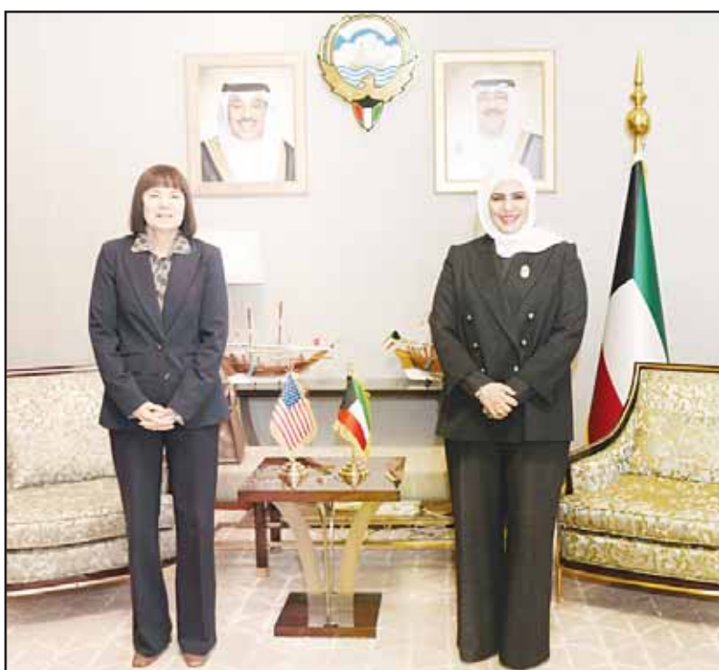
Minister of Finance, and Minister of State for Economic Affairs and Investment Nora Al-Fassam and US Ambassador to Kuwait Karen Sasahara.

Al-Fassam extolled the US partnership's positive role in backing Kuwait's economy and carrying out development projects, in addition to helping achieve Kuwait Vision 2035, in a manner that contributes to enhancing Kuwait's position as an attractive economic hub in the region, it noted.