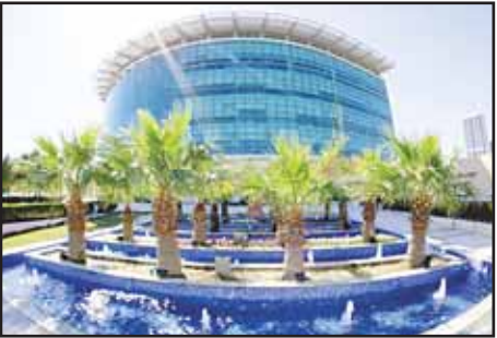
The Dasman Diabetes Institute

KUWAIT CITY, Dec 30: Dasman Diabetes Institute (DDI) which was established by Kuwait Foundation for Advancement of Sciences invites you to the 1st International Dasman Diabetes Institute Summit (IDDS) on Advanced Diabetes Care 2025, which will be held at Waldorf Astoria hotel in Kuwait from January the 23rd until the 25th.