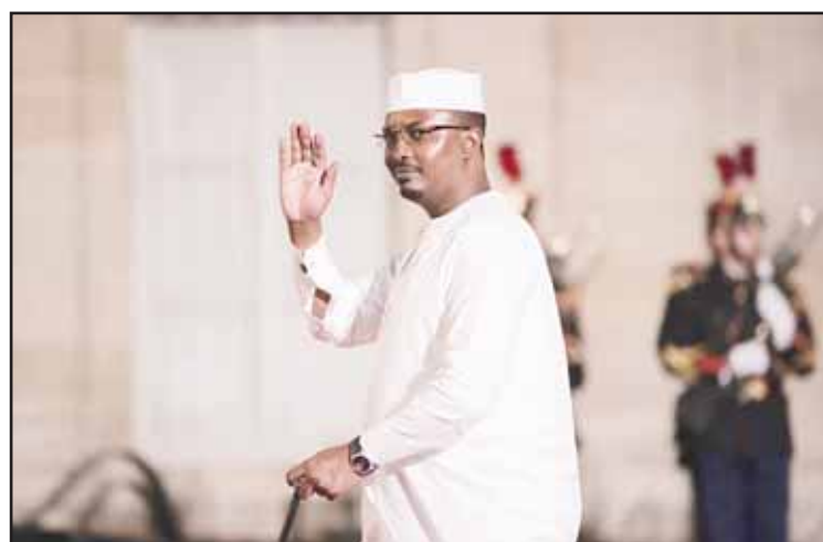
Chad's President General Mahamat Idriss Deby arrives at the 19th Francophonie Summit, at the Elysee Palace, in Paris, Oct. 4, 2024. (AP)

More than 10 opposition parties are boycotting the vote, including the main Transformers party, whose candidate, Succes Masra, came second in the presidential election.