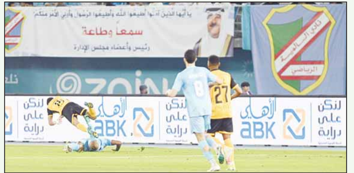
Bank logo and campaign during the final of His Highness the Amir Cup.

KUWAIT CITY, Dec 30: In 2024, Al Ahli Bank of Kuwait (ABK) partnered closely with the Central Bank of Kuwait (CBK) and the Kuwait Banking Association (KBA) to support the 'Let's Be Aware' banking awareness campaign, aimed at achieving financial inclusion in Kuwait. The campaign seeks to educate customers on a variety of topics, including different types of accounts, cards, bank loans, customer rights and obligations, combating banking and financial fraud, investment and savings, digital services, and resources for individuals with special needs.