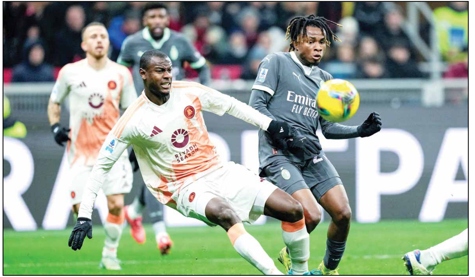
Roma's Evan Ndicka, left, fights for the ball with AC Milan's Samuel Chukwueze during the Serie A soccer match between AC Milan and Roma at the San Siro stadium, in Milan, Italy.

Fonseca went to Milan's training ground on Monday to say goodbye to the team and staff.