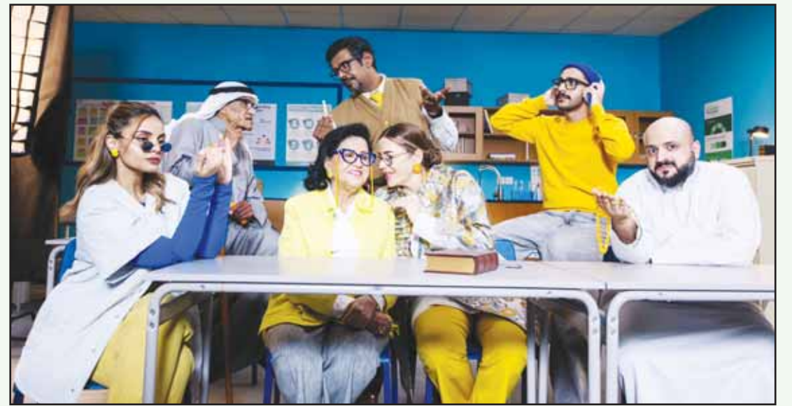
One of the shots of the 'Let's Be Aware' campaign during Ramadan.