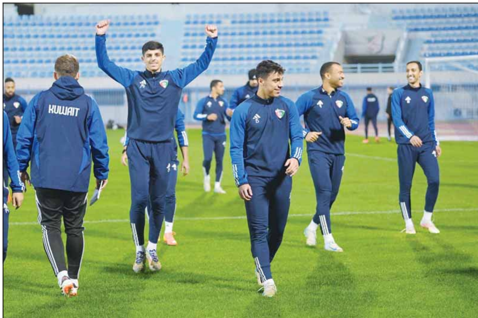
Great optimism from Kuwait during the last training session before facing Bahrain.