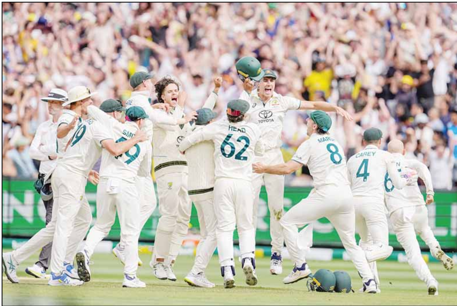
Australian players celebrate after winning the fourth cricket test against India at the Melbourne Cricket Ground, Melbourne, Australia.