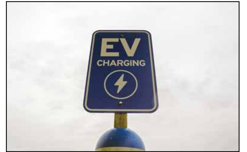
A sign is displayed at an electric vehicle charging station, March 8, 2024, in London, Ohio.

Sales data from China's leading NEV makers confirm their increasingly strong foothold. In October, NEV giant BYD shattered the monthly sales record for Chinese auto companies in terms of NEV sales, delivering an astounding 502,657 units and setting a new monthly sales record for global car manufacturers.