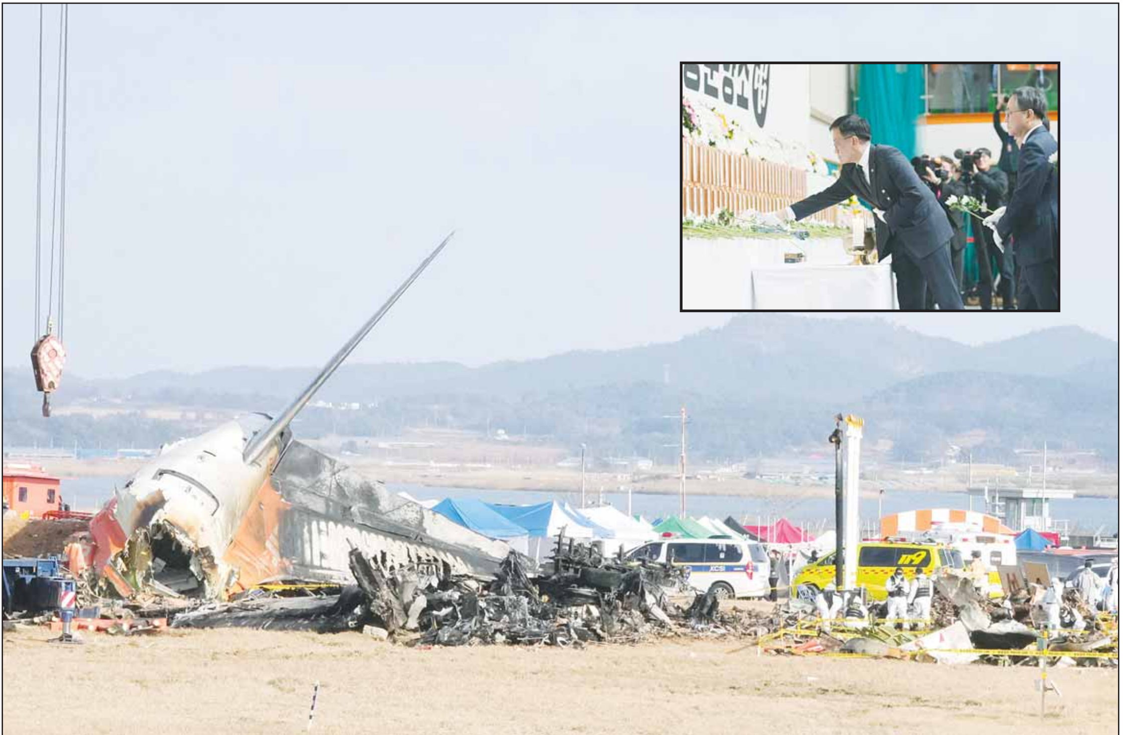
Rescue team members work at the site of a plane fire at Muan International Airport in Muan, South Korea, Monday, Dec. 30, 2024. Inset: South Korea's acting President Choi Sang-mok places a flower for the victims on a plane which skidded off a runway and burst into flames, at a memorial altar at Muan sport park in Muan, South Korea, Monday.

Transport Ministry plans to conduct safety inspections of all of 101 Boeing 737-800 jetliners