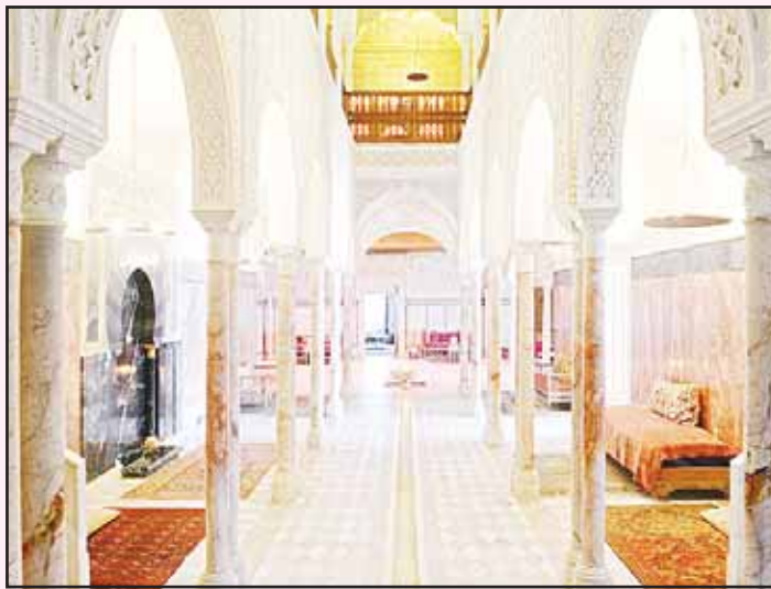
One of the corridors inside the palace.