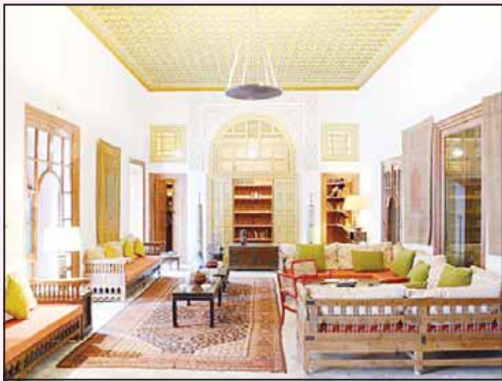
The main living room in the palace.