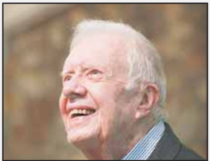
Former US President Jimmy Carter smiles as he returns to Maranatha Baptist Church in Plains, Ga., to teach Sunday school, June 9, 2019.

KUWAIT CITY, Dec 30, (KUNA): His Highness the Amir Sheikh Meshal Al-Ahmad Al-Jaber Al-Sabah has sent a cable of condolences to US President Joe Biden expressing condolences on death of the former president, Jimmy Carter, invoking Almighty Allah to grace his family with patience.