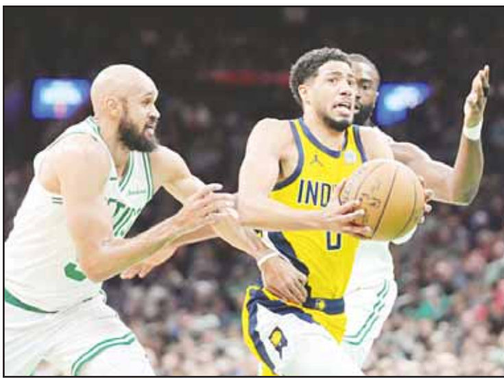
Indiana Pacers guard Tyrese Haliburton, center, drives in front of Boston Celtics guard Derrick White, left, and guard Jaylen Brown, behind right, in the first half of an NBA basketball game in Boston.

In Houston, Tyler Herro scored 27 points before being one of six people ejected after a fight in the final minute of the Miami Heat's 104-100