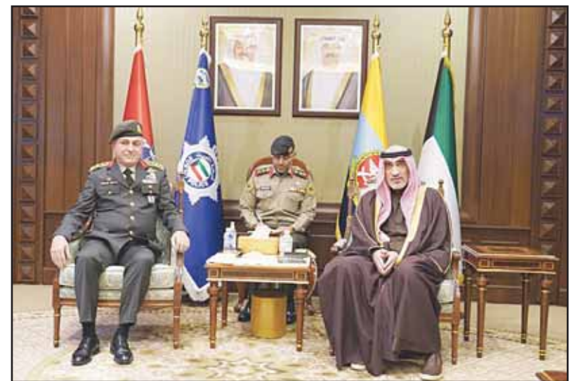
First Deputy Prime Minister, Minister of Defense and Minister of Interior during his meeting with the Turkish Chief of the General Staff.

Caution advised amid severe weather conditions