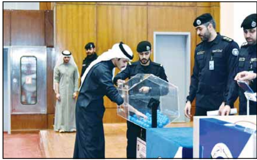
The public draw in progress.

ders Committee meeting at the Ministry of Foreign Affairs headquarters, discussing topics of the agenda.