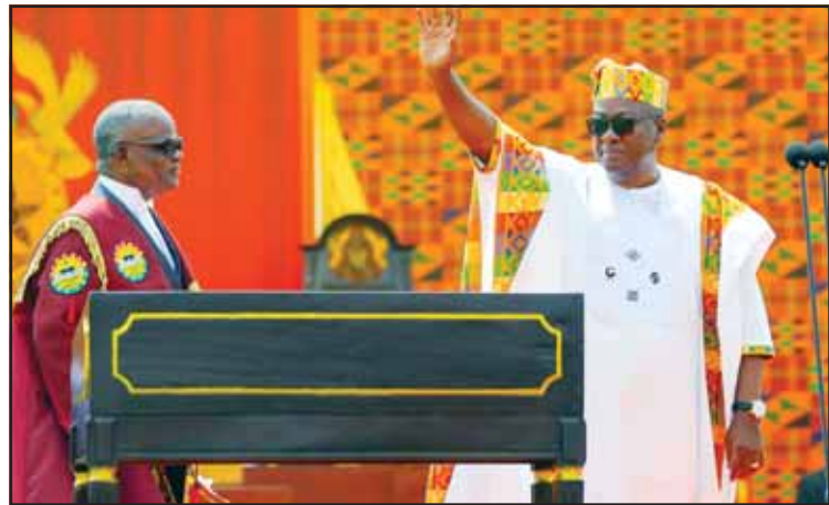
Ghana's President-Elect John Dramani Mahama, waves after taking the oath of office at his inauguration, at the Independence Square in Accra, Ghana, Tuesday, Jan. 7, 2025.

The vice premier led a team to the quake site to guide the rescue and relief efforts. Upon his arrival, Zhang immediately headed to Changsuo Township, the most severely affected area.