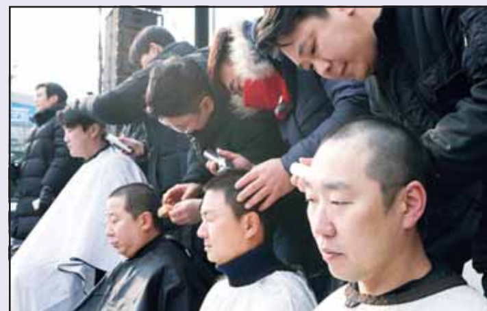
Supporters of impeached South Korean President Yoon Suk Yeol have their heads shaved as they attend a rally to oppose his impeachment near the presidential residence in Seoul, South Korea, Wednesday, Jan. 8, 2025.