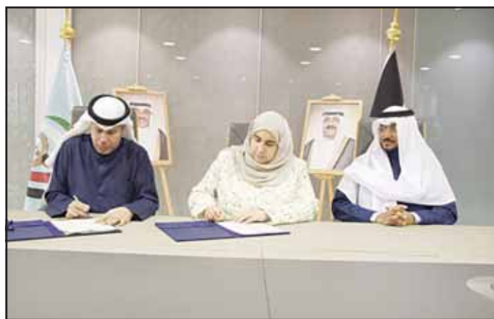
Photo during the signing of an official document.

"The public treasury shall cover the actuarial deficit of the institution by decision of the relevant minister, with payments not less than 500 million Kuwaiti dinars at the beginning of each fiscal year starting from April 1, 2022, in cash or in-kind to the institution until the full actuarial deficit is settled. This shall be based on the financial position assessment of the institution as of March 31, 2019, approved by its Board of Directors. The valuation of in-kind payments shall be carried out by accredited appraisers from the competent authorities prior to payment and under the supervision of