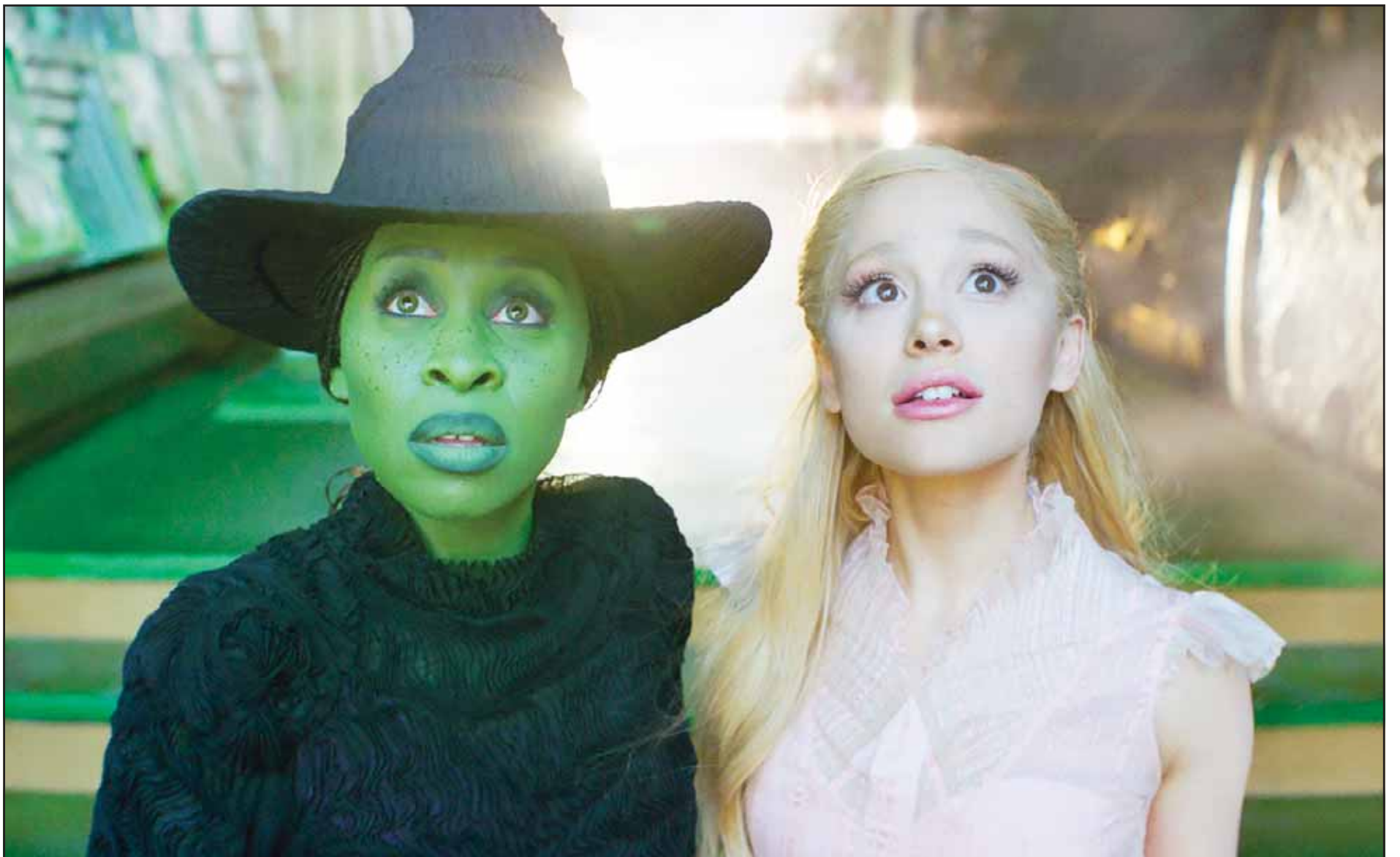
This image released by Universal Pictures shows Cynthia Erivo, (left), and Ariana Grande in a scene from the film 'Wicked.'