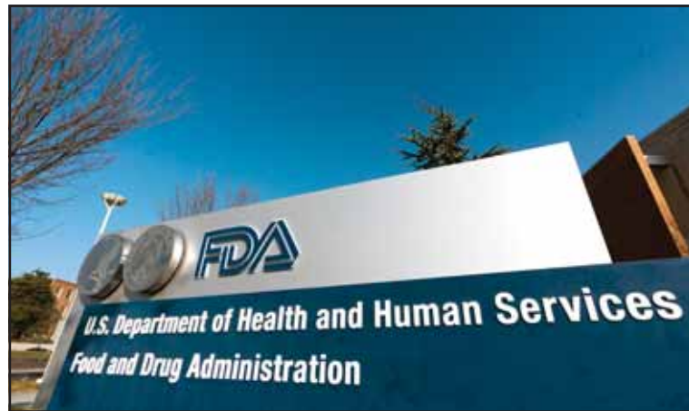
Food and Drug Administration (FDA) building is shown in Silver Spring, Md., Dec. 10, 2020.

The department is now accredited as a specialized center for treating heart and blood circulation diseases in neonates, addressing the critical needs of this vulnerable group.