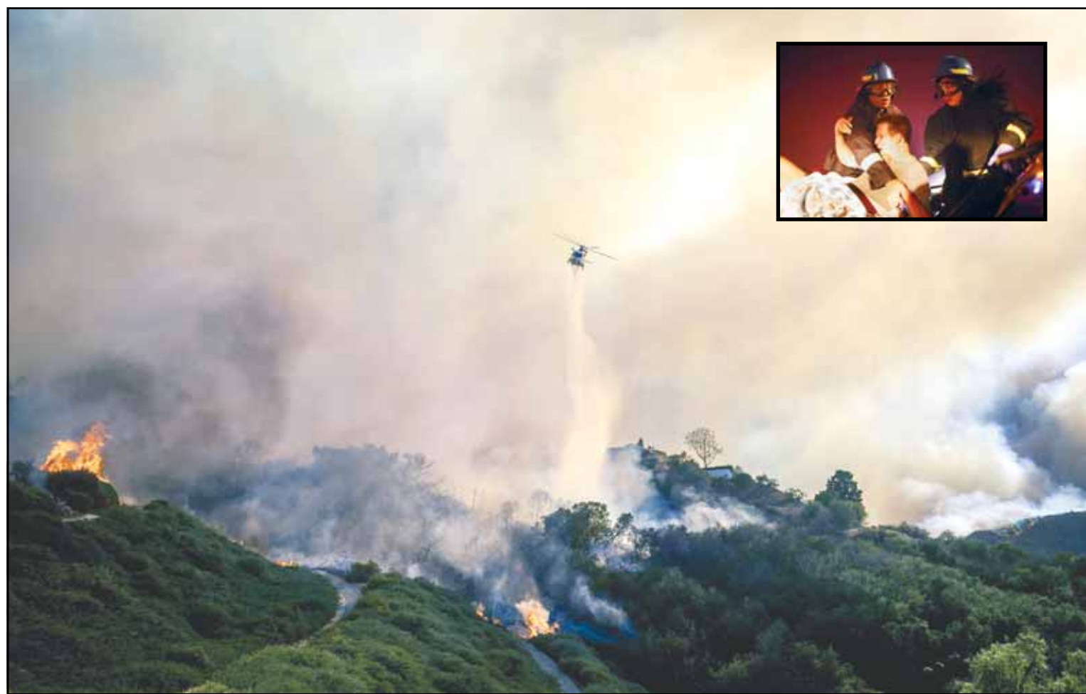
Water is dropped on the advancing Palisades Fire by helicopter in the Pacific Palisades neighborhood of Los Angeles, Tuesday, Jan. 7, 2025. Inset: A resident of a senior center is evacuated as the Eaton Fire approaches Tuesday, Jan. 7, 2025 in Altadena, Calif.

Many structures destroyed as winds kick up: governor