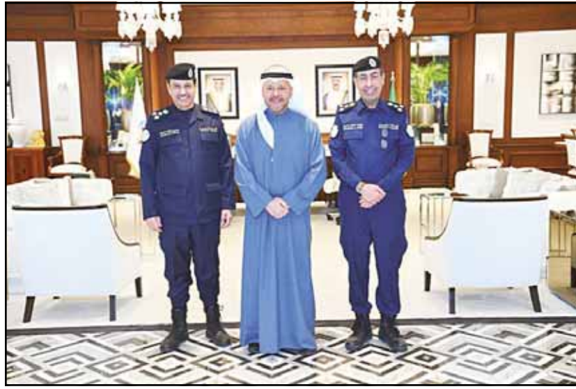
Farwaniya Governorate photo

— Compiled by PFX Fernandes/ Mahmoud Attiyyeh?