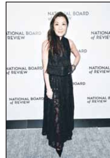
From left: Mikey Madison, Christine Baranski and Michelle Yeoh attend the National Board of Review Awards gala at Cipriani 42nd Street on Tuesday, Jan. 7, 2025, in New York.