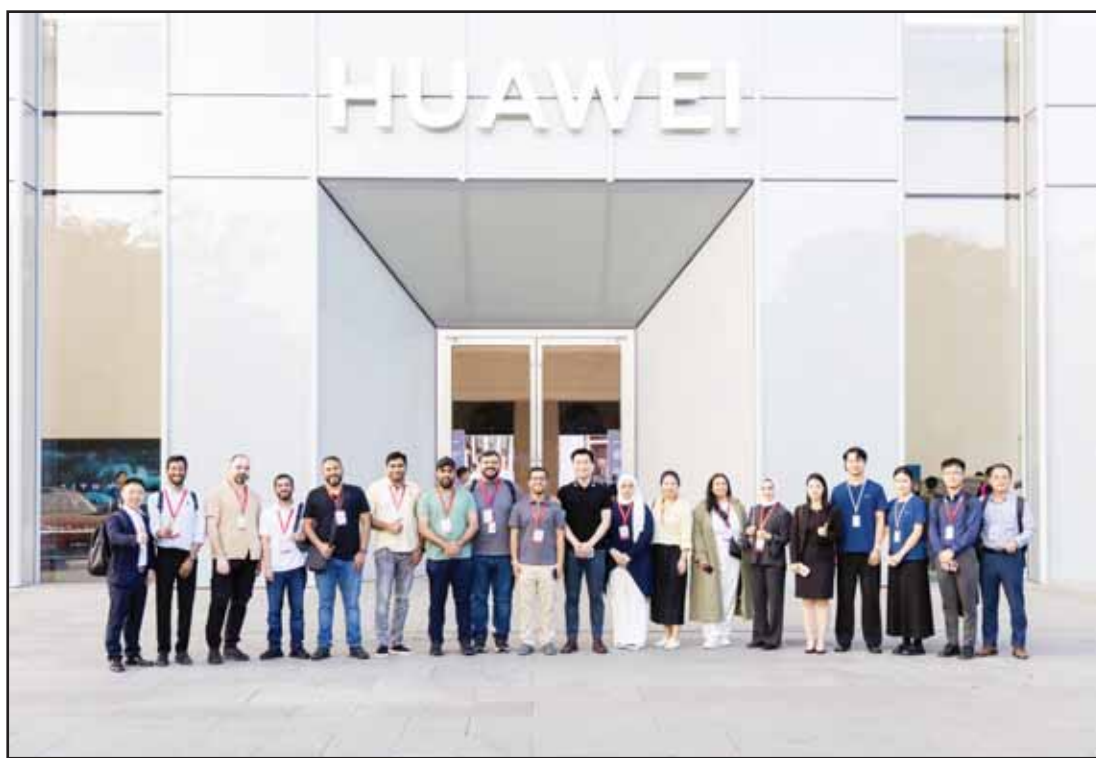
stc employees visiting Huawei headquarters in China.