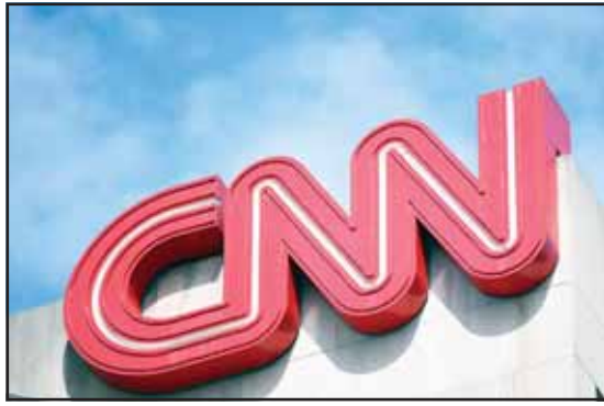
Signage seen at the CNN Center in Atlanta on April 21, 2022.

Rather than defend statements that George Stephanopoulos made about Trump last spring, ABC News last