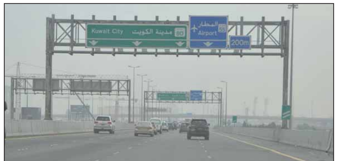
Kuwait skies darken as drivers maneuver through a highway, braving unpredictable weather conditions.

The Meteorology Department has issued a warning about these weather conditions while at the same time encouraging people to use the MOI operations No 112 during emergency situations.