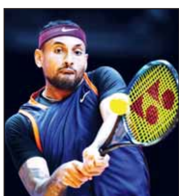
In this file photo, Nick Kyrgios of Eagles returns the ball to Grigor Dimitrov of Falcons during a match of Day 3 of the World Tennis League at Coca-Cola Arena in Dubai, United Arab Emirates.

Gao, who reached a career-high No. 146 after leading China to the quarterfinals of the United Cup, led