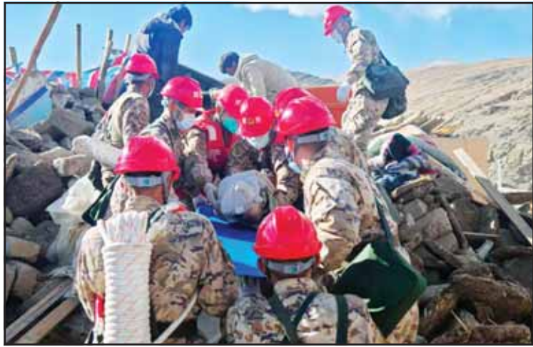
In this photo released by Xinhua News Agency, first responders perform rescue work at a village in Changsuo Township of Dingri County in Xigaze, southwest China's Tibet Autonomous Region, Jan. 7, 2025. (Xinhua via AP)