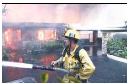
A firefighter battles the Palisades Fire as it burns a residence in the Pacific Palisades neighborhood of Los Angeles, Tuesday, Jan. 7, 2025.

The traffic jam on Palisades Drive prevented emergency vehicles from getting through and bulldozer was brought in to push the abandoned cars to the side and create a path. Video along the Pacific Coast Highway showed widespread destruction of homes and