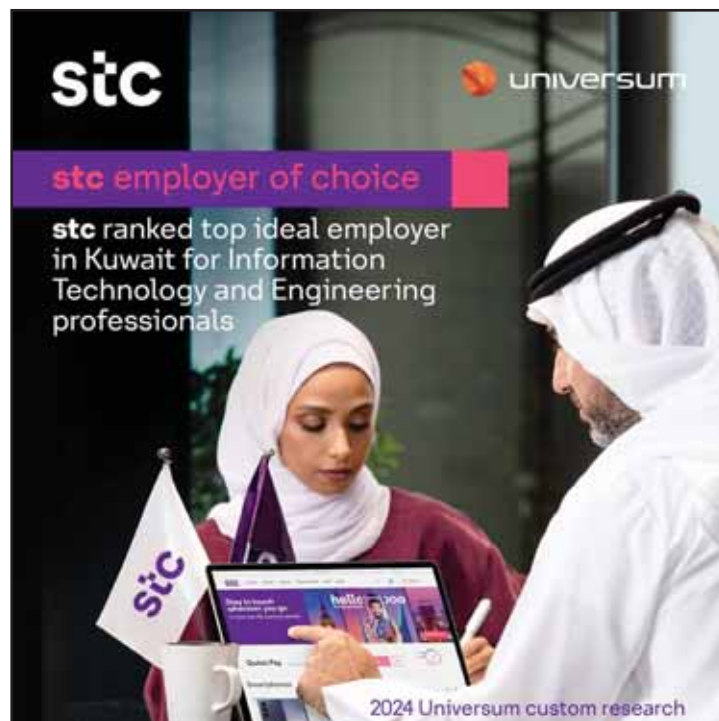
Employer of Choice.