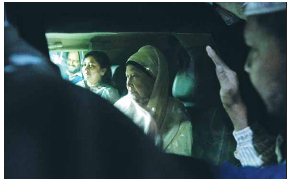
Bangladesh's ailing former Prime Minister Khaleda Zia, right, leaves in a car on her way to the airport in Dhaka, Bangladesh, to travel to London for medical treatment, Tuesday, Jan. 7, 2025.

The special air ambulance was sent by Qatar's emir, Sheikh Tamim bin Hamad bin Khalifa Al Thani. Hundreds of her supporters gathered outside her residence in the city's upscale