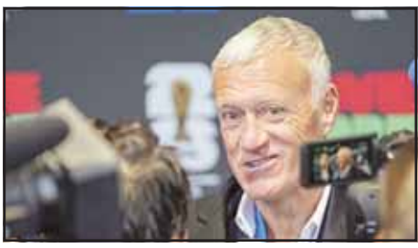
In this file French head coach Didier Deschamps attends the media during the UEFA preliminary draw for the 2026 World Cup.