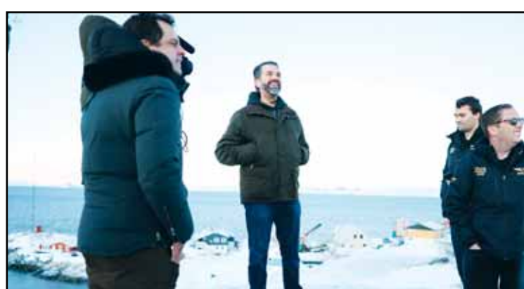
Donald Trump Jr., center, smiles after arriving in Nuuk, Greenland, Tuesday, Jan. 7, 2025.

In a statement, Greenland's government said Donald Trump Jr.'s visit was taking place "as a private individual"