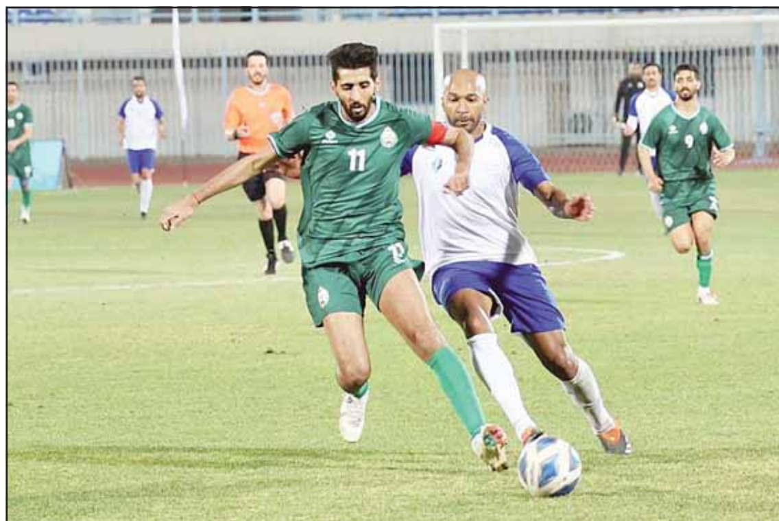
Players challenge for the ball during the league.

KUWAIT CITY, Jan 8: The preliminary rounds of the Ministries, Authorities, and Government Institutions Football League have concluded, with the Ministry of Interior securing a spot in the semi-finals after finishing at the top of Group One with 17 points, including 5 wins, 2 draws, and 1 loss.