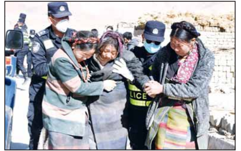
In this photo released by Xinhua News Agency, rescuers transfer the injured at Zhacun Village of Dingri County in Xigaze, southwest China's Tibet Autonomous Region, Tuesday Jan. 7, 2025. (Xinhua via AP)