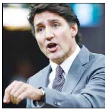
Justin Trudeau – Canadian Prime Minister

Earlier today, Trump said in a press conference in Florida that he was not considering military force to annex Canada but suggested he would use