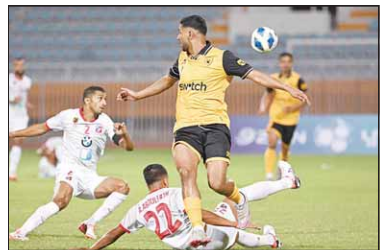
A file photo of Kuwait Club and Al Qadsiya players in action.