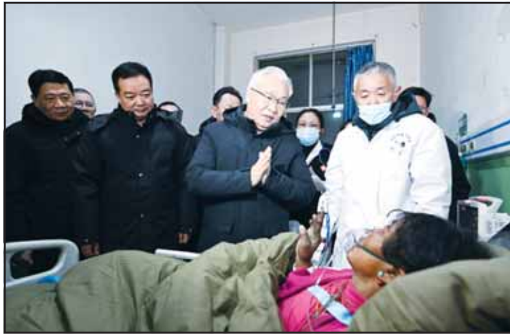
Chinese Vice Premier Zhang Guoqing, also a member of the Political Bureau of the Communist Party of China (CPC) Central Committee, visits a resident injured in the earthquake at the People's Hospital of Dingri County in Xigaze City, southwest China's Xizang Autonomous Region, Jan. 7, 2025.