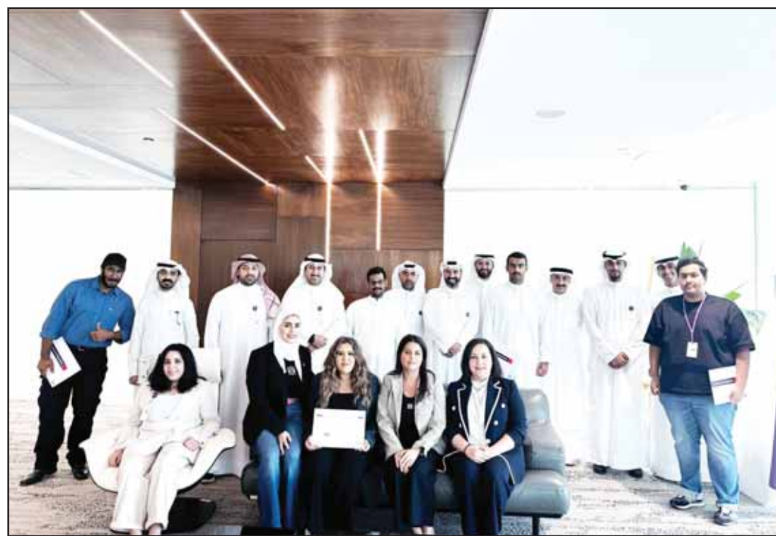
Trainees in a group photo with the Acting CEO of the Human Resources Sector and a number of the company's executive management.

KUWAIT CITY, Jan 8: Kuwait Telecommunications Company – stc, a world-class digital leader providing innovative services and platforms to customers, enabling the digital transformation in Kuwait, emphasized its ongoing commitment to enhance its internal work culture through transformative initiatives that focus on elevating the employee experience. With its strategy set on setting new standards in achieving employee well-being and promoting professional growth, stc has introduced new programs and policies aimed at further improving transparency and inclusivity while maintaining a feedback-driven and open culture at the Company. Accordingly, our last employee engagement survey reflected the positive impact of the company's efforts.