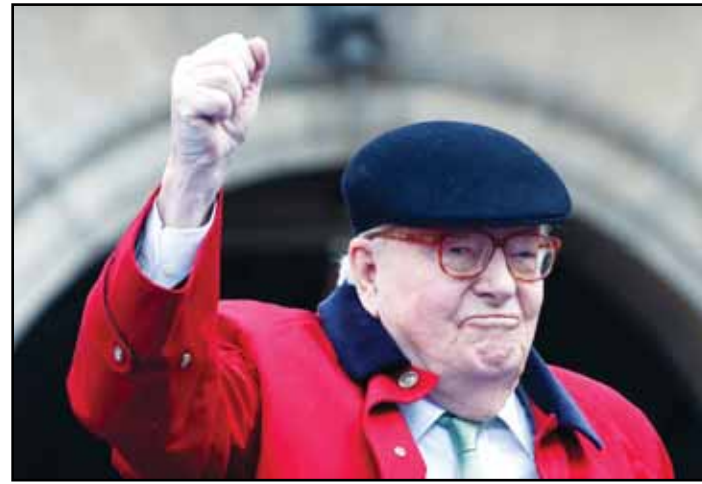
Former far-right National Front party leader Jean-Marie Le Pen clenches his fist at the statue of Joan of Arc, Monday May 1, 2017, in Paris.

Le Pen - who reached the second round of the 2002 presidential election that Jacques Chirac went on to win in a landslide - was eventually estranged from his daughter Marine Le Pen. She renamed his National Front party, ousted him and trans-