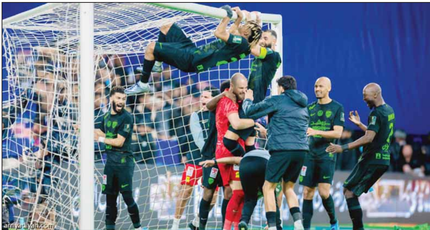
Al-Ittihad players celebrate after reaching the semifinals of the King's Cup.