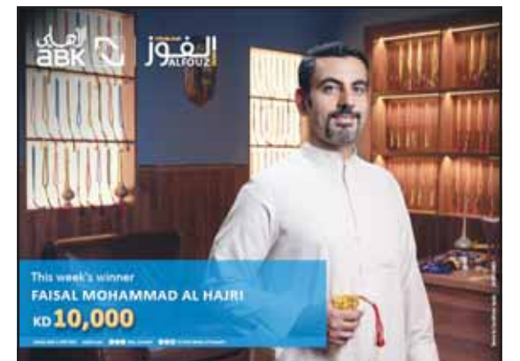
ABK - Alfouz winners 2025 weekly winner flyer

Open an Alfouz account today and enjoy increased oppor-