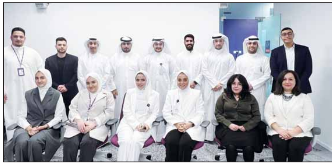
A photo of the trainees with the company employees who supervised their training.

In line with its strategy to promote transparency, inclusivity, and a culture of care through feedback-driven actions