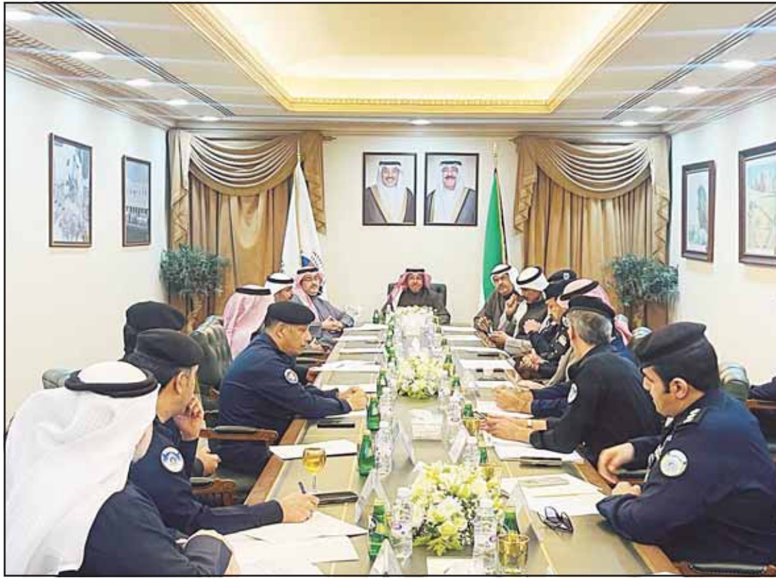
Photo during the governors' meeting.