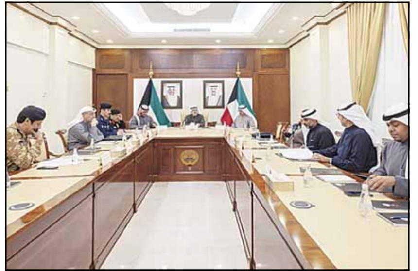
Deputy Foreign Minister Ambassador Sheikh Jarrah Jaber Al-Ahmad Al-Sabah chairs the Border Committee meeting at the Ministry of Foreign Affairs.