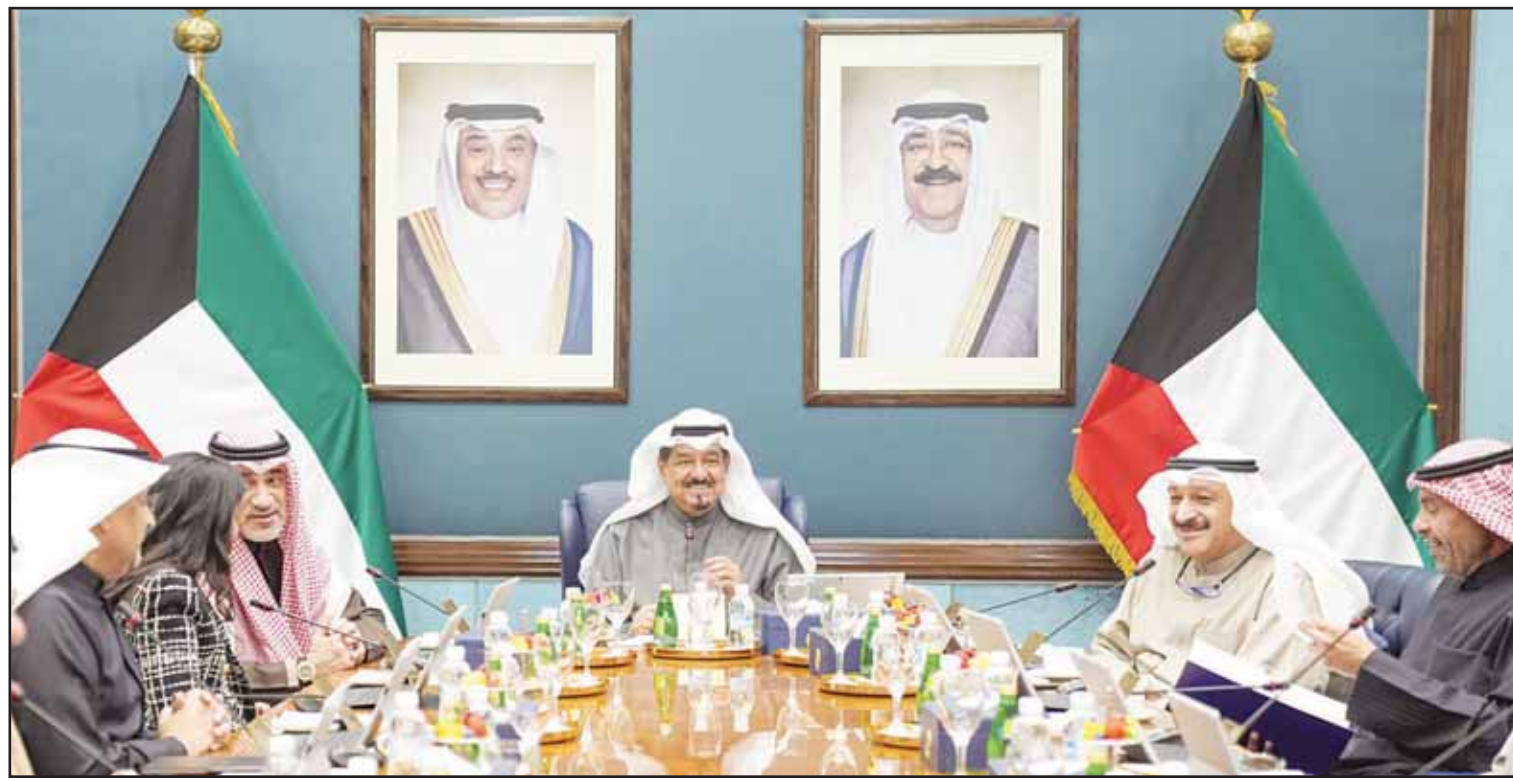
His Highness the Prime Minister Sheikh Ahmad Abdullah Al-Ahmad Al-Sabah presides over the weekly Cabinet meeting on Wednesday.

According to Article 1 of the ministerial resolution No. 2646/2024, the Kuwaiti civil ID card is considered a transit document that can replace the passport when traveling between Kuwait and the Gulf Cooperation Council (GCC) countries, including Saudi Arabia, Qatar, Oman, Bahrain, and the United Arab Emirates.