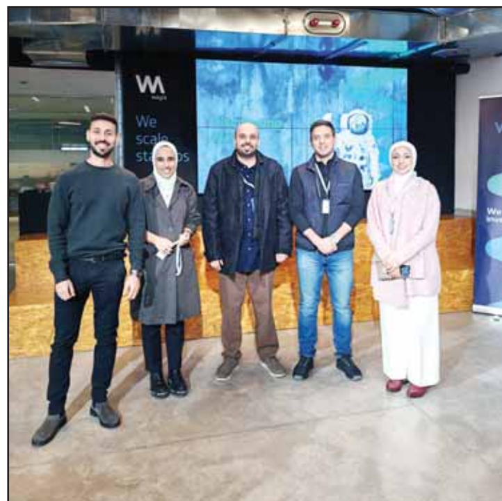
stc employees' participation in the Innovation Challenge Program.