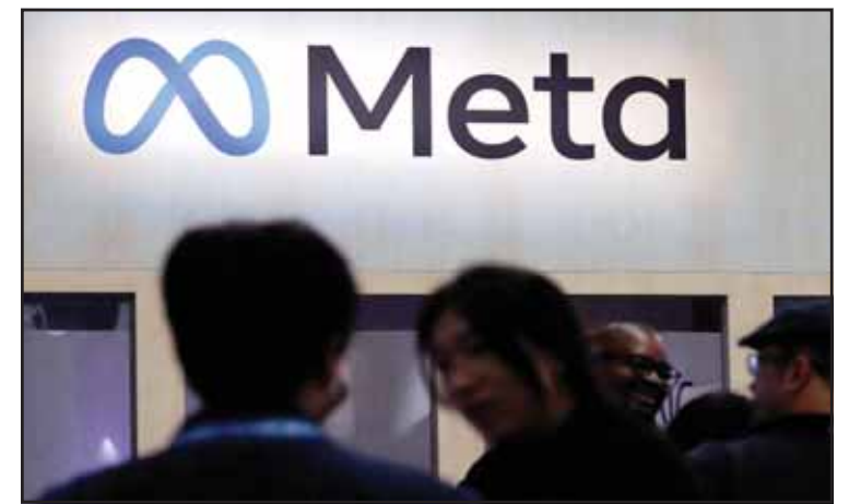
Attendees visit the Meta booth at the Game Developers Conference in San Francisco on March 22, 2023.

Meta is among several tech companies apparently working to get in