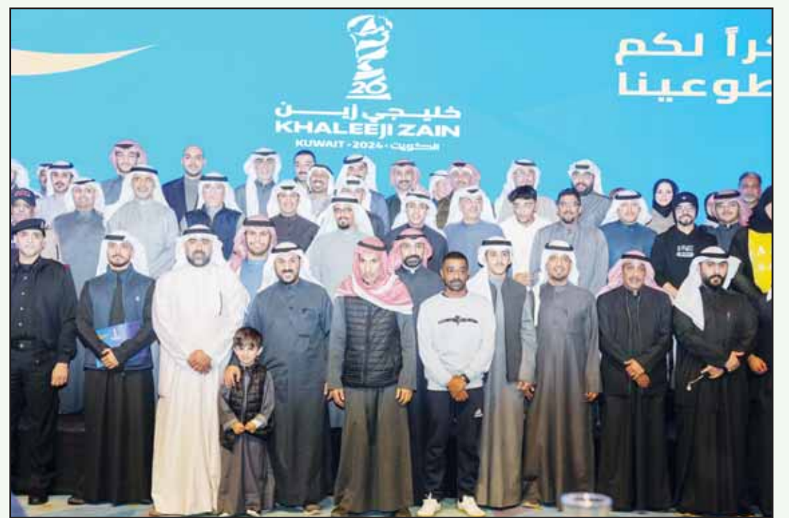
Honoring a group of volunteers.

Organizing committee hosted event highlighting their contributions to the tournament's success