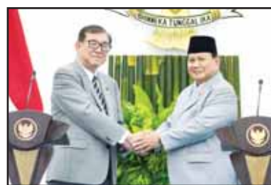
Indonesian President Prabowo Subianto, right, shakes hands with Japan's Prime Minister Shigeru Ishiba during a joint press conference after their meeting at Bogor Presidential Palace in Bogor, West Java, Indonesia, Jan. 11, 2025.

The navy said they conduct regular patrols and operations in Sri Lankan waters to curb illegal fishing practices of foreign fishing boats, taking into account the impact of those practices on the livelihood of local fishermen.