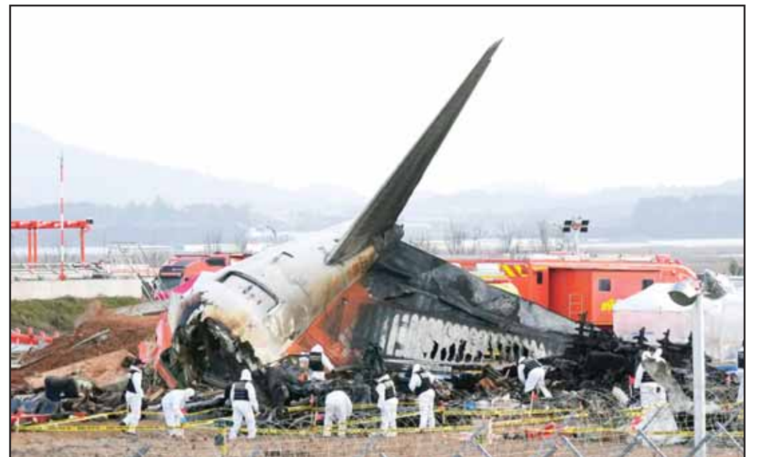
Rescue team members work at the site of a plane crash at Muan International Airport in Muan, South Korea on Dec. 31, 2024.

South Korean officials have also pledged to improve airport safety after experts linked the high death toll to Muan airport's localizer system, the structure hit by the aircraft as it crashed. The localizer, a set of antennas designed to guide aircraft during landings, was housed in a concrete structure covered with dirt on an elevated embankment.