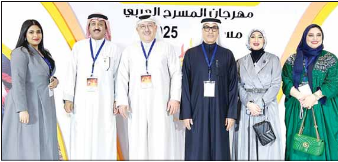
The Kuwaiti delegation participating in the Arab Theater Festival held in Muscat.