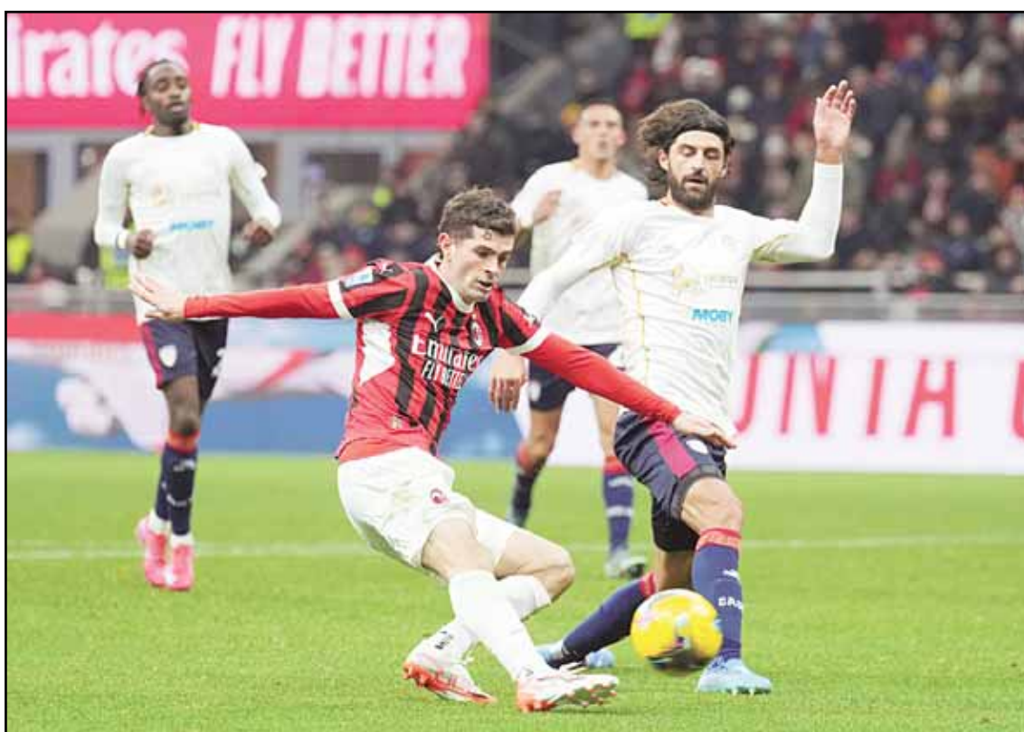
AC Milan's Christian Pulisic, left, attempts a shot on goal during the Serie A soccer match between AC Milan and Cagliari at the San Siro stadium, in Milan, Italy.

But Cagliari was level just four minutes later as Maignan - who made