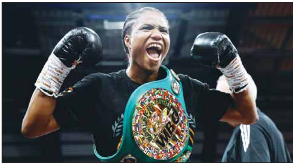
Boxer Caroline Dubois celebrates after the WBC World Lightweight Championship contest against Jessica Camara at the Canon Medical Arena, Sheffield, England.

"She's the best female fighter on the planet, by a mile," McGuigan said.