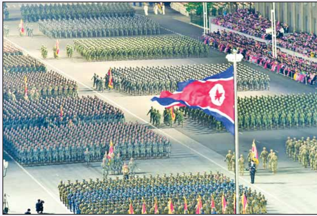
This photo provided by the North Korean government, shows a military parade to mark the 90th anniversary of North Korea's army at the Kim Il Sung Square in Pyongyang, North Korea, on April 25, 2022. (AP)

Analysts say that without the influx of North Korean troops, Russia would have struggled to pursue its strategy