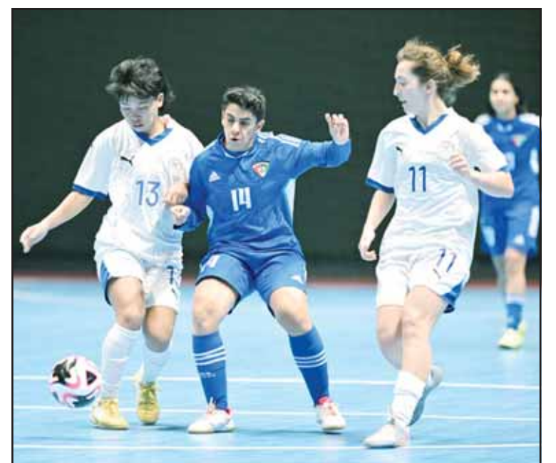
Players vie for the ball during Kuwait and Philippines match.