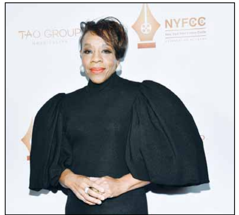
Marianne Jean-Baptiste attends the New York Film Critics Circle Awards at Tao Downtown on Jan. 8, 2025, in New York.

Pansy is, of course, the biggest tragedy of all, a human so lost in their own resentments, manifested or real, that she may never get out of it. Sure she makes everyone's life a little miserable when she's around, but she's having the worst time of all and it never, ever ends. Chantelle tries to remind her that she has a choice in the matter. You wonder if she believes or even hears her, or if she's just too far gone.