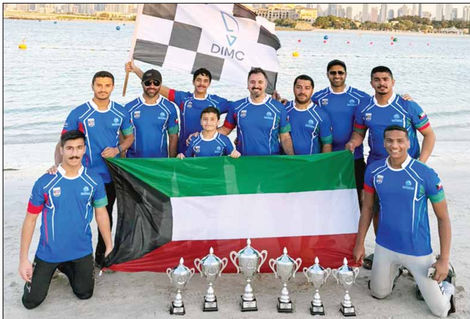
Kuwait jet ski team poses with its trophies.

DUBAI, Jan 12, (KUNA): Kuwait's Club of Sea Sports claimed six trophies across various categories in the first round of the UAE Jet Ski Championship held in Dubai.