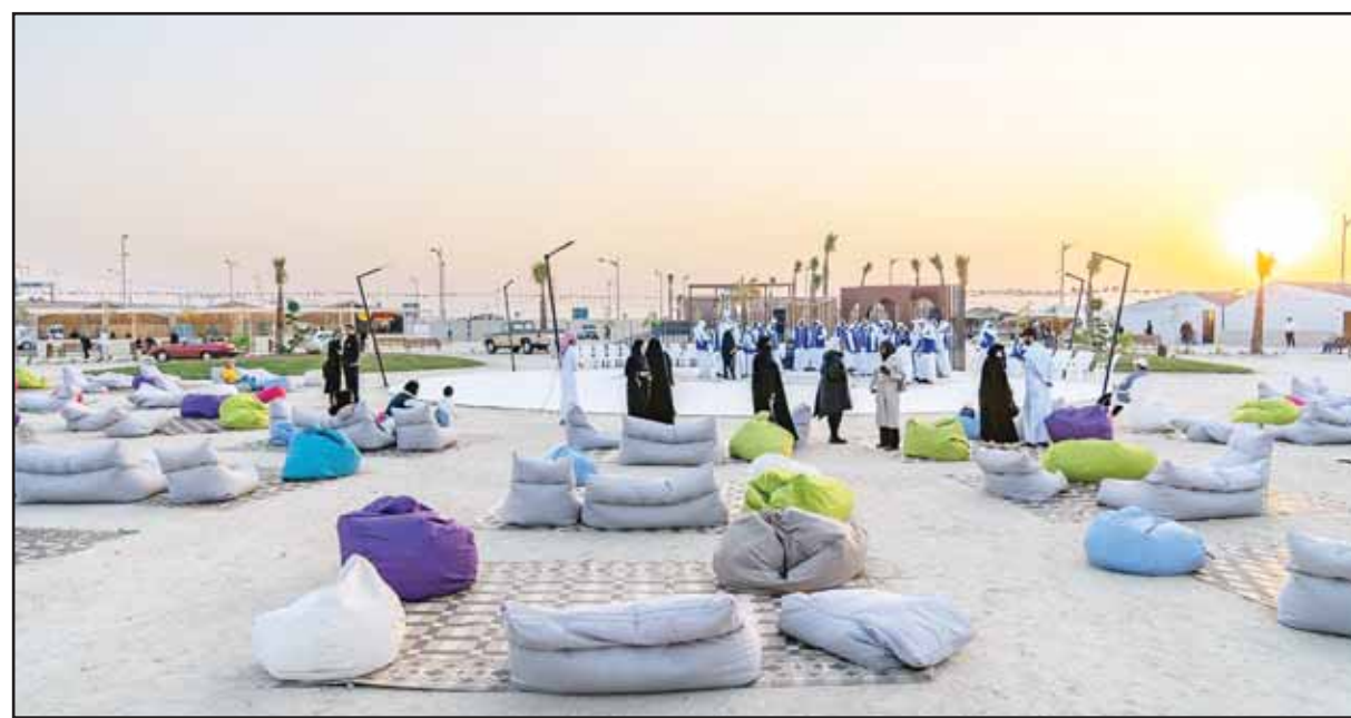
'Makshat 3' showcases remarkable infrastructure advancements and inclusive offerings, marking a milestone in its historic success.