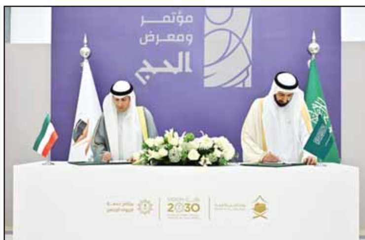
Kuwaiti Minister of Awqaf and Islamic Affairs Dr. Mohammad Al-Wasmi and Saudi Minister of Hajj and Umrah Dr. Tawfiq Al-Rabiah during the signing of the agreement.

The conference, which will be attended by Kuwait's Minister of Awqaf, serves as a comprehensive strategic platform for exchanging expertise and knowledge, will run until January 16.