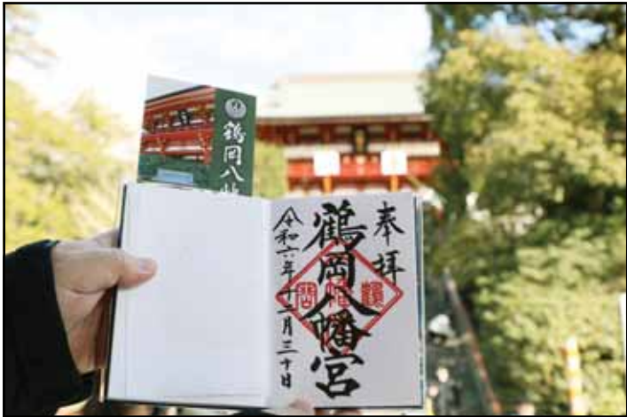
A Goshuin stamp at the Tsuruokaoka Shrine in Kamakura, Japan.