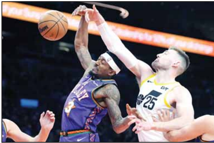
Phoenix Suns guard Bradley Beal (3) battles with Utah Jazz center Micah Potter (25) for a rebound during the first half of an NBA basketball game in Phoenix.

the Suns, who led by as many as 16 points but struggled to put away the Jazz, who dropped their third in a row, until the fourth quarter. Grayson Allen had 14 points, nine in the final period.