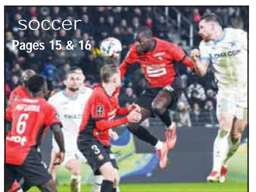
soccer Pages 15 & 16