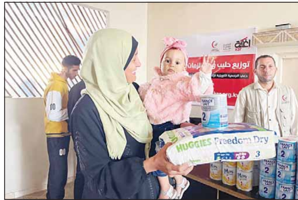
Half a million displaced people benefit from the Kuwaiti hospital in the southern Gaza Strip.

GAZA, Jan 12, (KUNA): The Kuwaiti Specialized Hospital announced on Sunday it has provided services to approximately half a million displaced Palestinian among the one million living in the city of Khan Younis in southern Gaza.