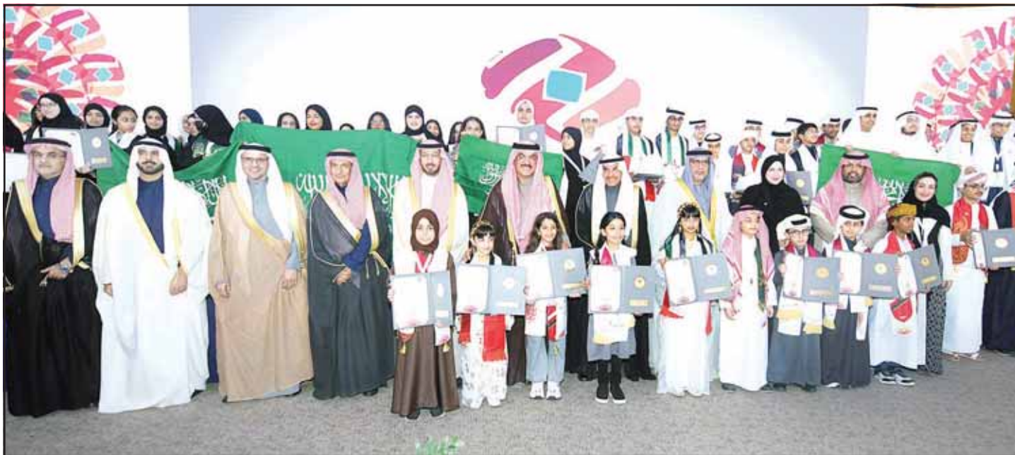
Kuwaiti Minister of Education Sayed Jalal Al-Tabtabaei with outstanding students from the Gulf countries.

His Highness the Amir also wished the UK Prime Minister good health and well-being and extended his best wishes for continued prosperity and progress for the UK and its people, and expressed hope for further growth and development in the historic relations between the two nations.