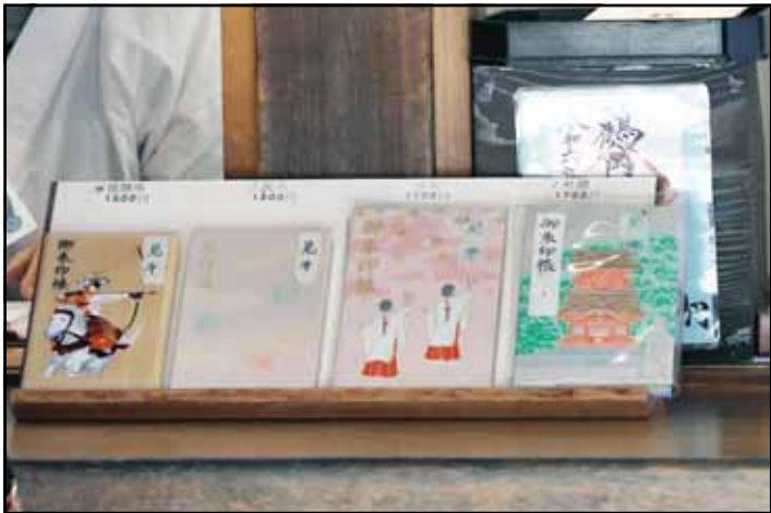
Various designs of Goshuin books.