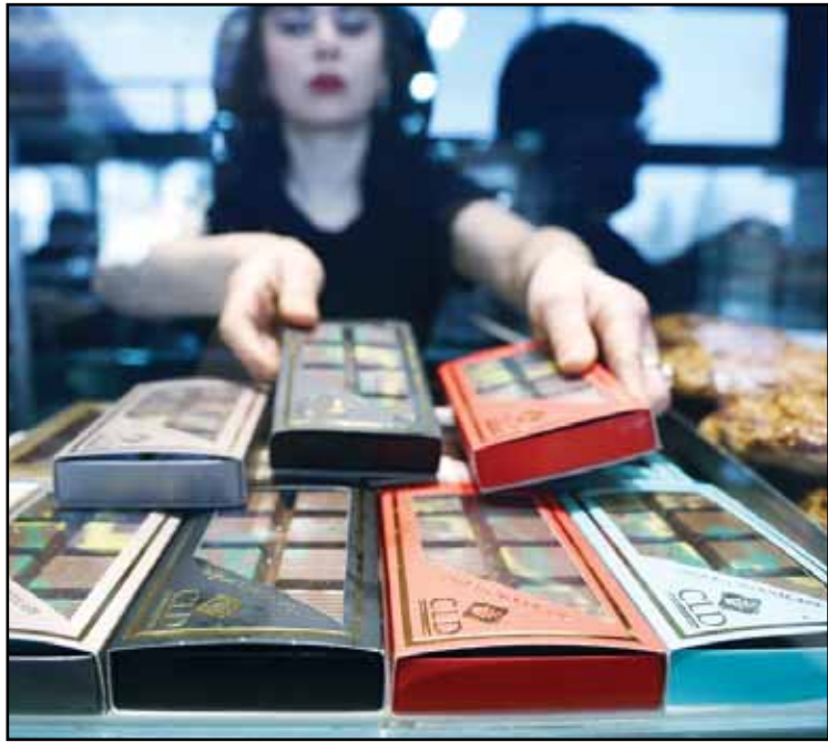
A saleswoman packages Dubai chocolate at a shop in Ankara, Türkiye, Jan. 8, 2025.