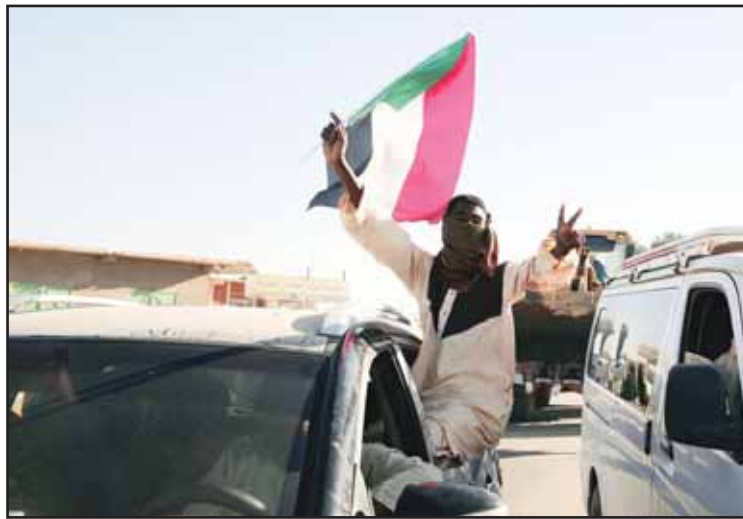
Left: A Sudanese man gestures waving a Sudan flag following the reports that Sudan's army had entered the central city of Wad Medani and pushed out its paramilitary rivals the Rapid Support Forces (RSF), in Merowe, Sudan, Saturday, Jan. 11, 2025. Right: People celebrate following the reports that Sudan's army had entered the central city of Wad Medani and pushed out its paramilitary rivals the Rapid Support Forces (RSF), in Merowe, Sudan on Saturday.

ministration said that the RSF and its proxies are committing genocide, and slapped sanctions on the RSF leader, Mohamed Hamdan Dagalo, as well as seven RSF-owned companies in the United Arab Emirates, including one handling gold likely smuggled out of