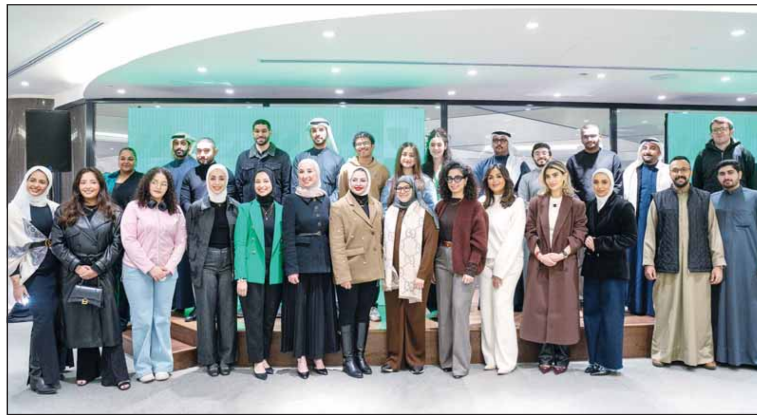
KONTINUE program launched to empower young Kuwaiti entrepreneurs.