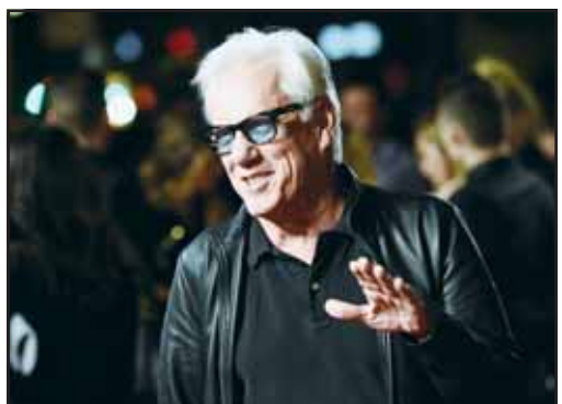
Actor James Woods attends the premiere of the film 'Bleed for This' in Beverly Hills, Calif., Nov. 2, 2016.

"All these houses behind me burned to the ground where their families enjoyed wonderful times together with their friends and family," said Guttenberg while pointing at one charred home before dropping his head in sadness. "There's really a lot of pain going on right now. I'm doing whatever I can to help alleviate it."