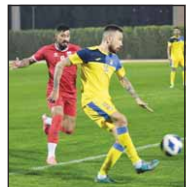
Players battling for the ball during first division league game.

Al-Jahra, with three points, did not participate in this round.