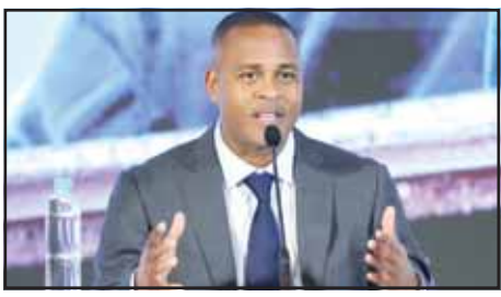
Former Barcelona star and newly appointed head coach of Indonesia's national soccer team Patrick Kluivert speaks to the media during a press conference in Jakarta, Indonesia.