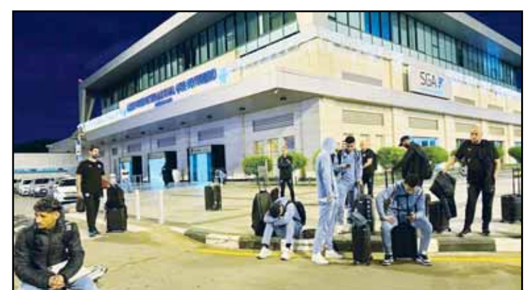
The stranded Pyramids Club players.

CAIRO, Jan 12: The Egyptian Pyramids Club experienced a serious air emergency during its return flight from Angola to Cairo, resulting in an emergency evacuation at Luanda Airport.