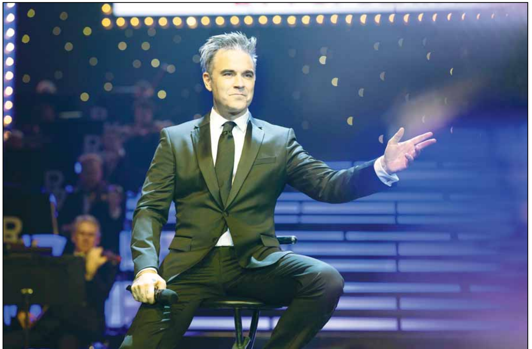
This image released by Paramount Pictures shows Robbie Williams in a scene from 'Better Man.'