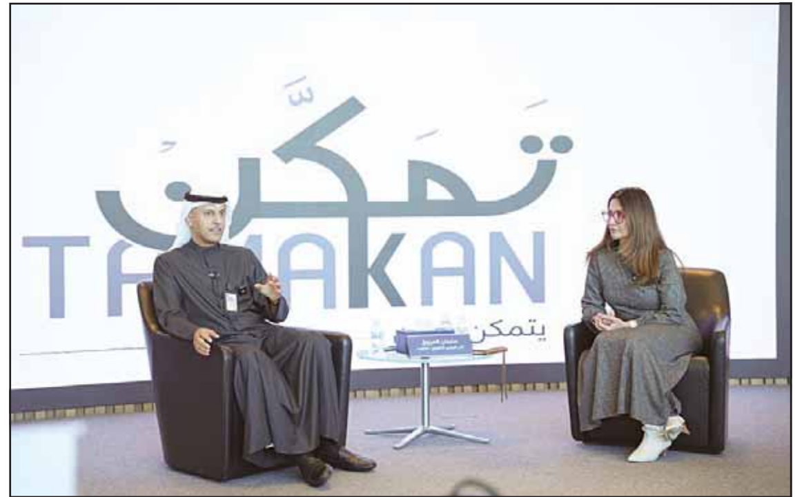
Founding principles drive NBK's continued success and innovation.