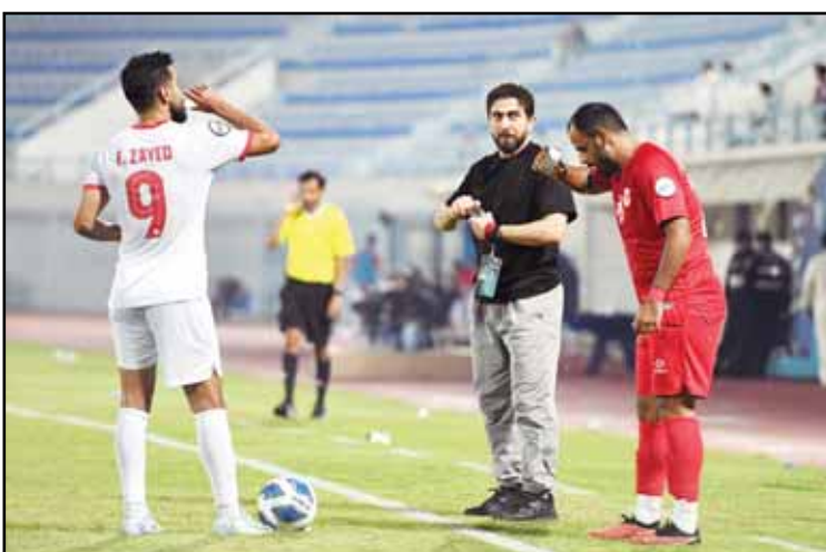
Kuwait looks to return to winning ways.

Although Kuwait Club triumphed 3-0 over Al-Fahaheel in the first half of the season, the "Whites" are aware that the current situation has changed, and the match will be much more challenging. Al-Fahaheel