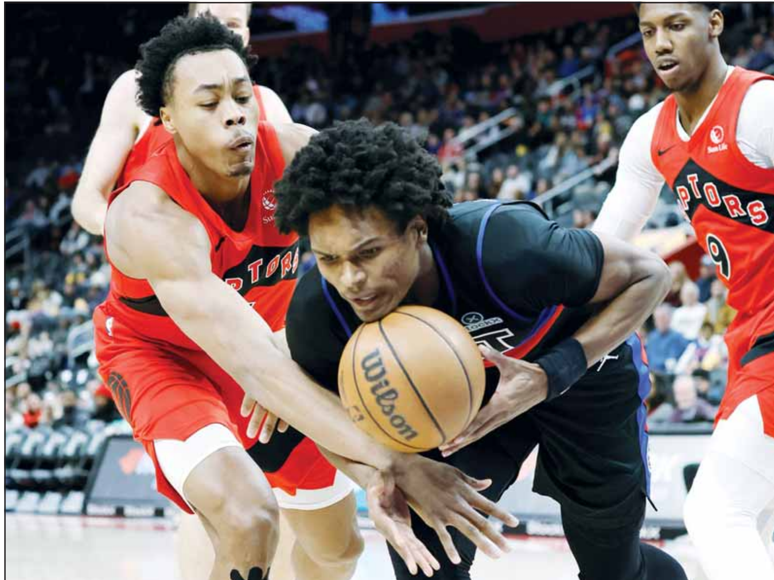
Toronto Raptors forward Scottie Barnes (4) defends against Detroit Pistons forward Ausar Thompson (9) during the first half of an NBA basketball game in Detroit.