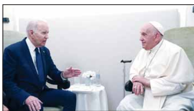
President Joe Biden, left, meets with Pope Francis in Savalletri, Puglia, Italy, June 14, 2024. (AP)

Power outage numbers around Atlanta crept up Friday night as meteorologists warned of accumulating freezing rain. More than 110,000 customers were without electricity, mostly in the Atlanta area. (AP)