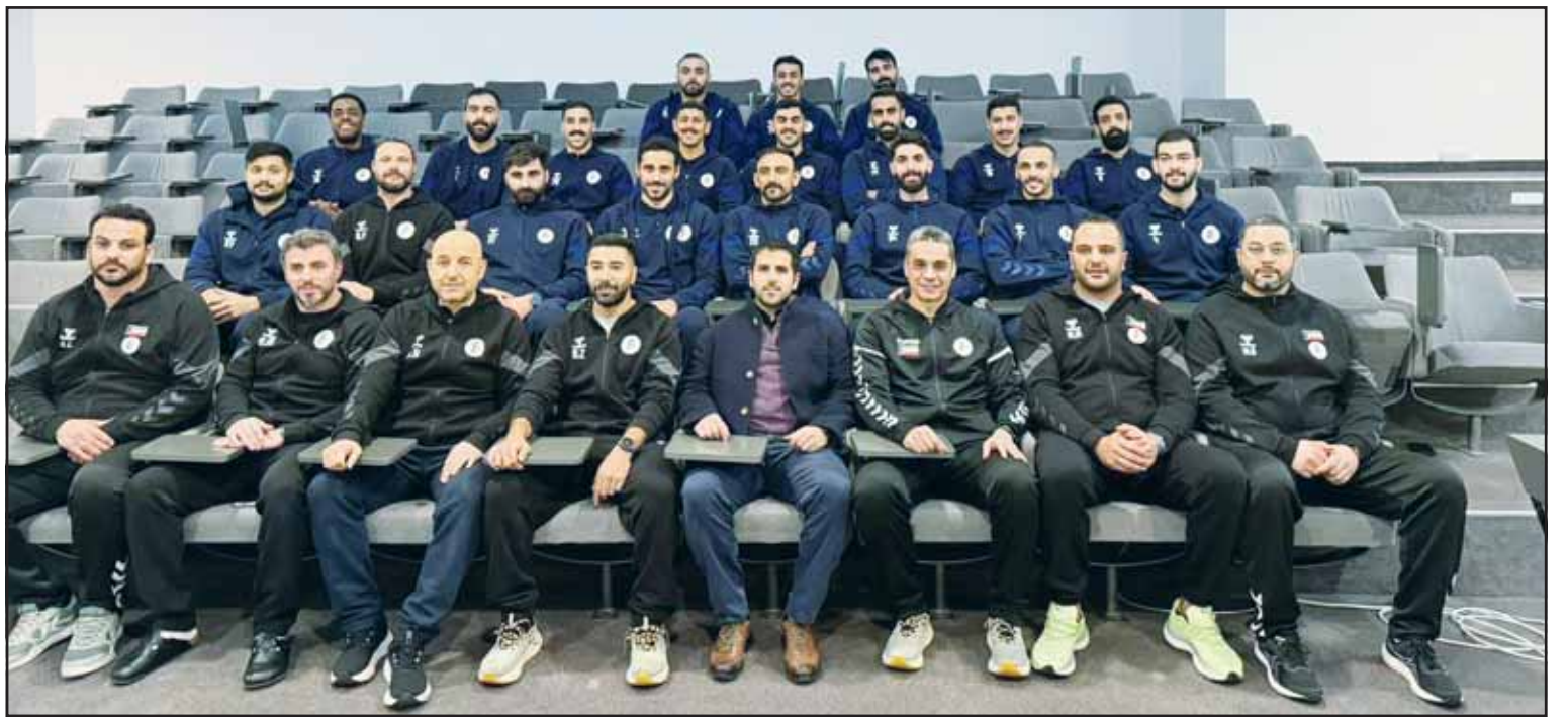
Sheikh Fahad Al-Nasser poses with Kuwait handball team.

Kuwait's preparation included an external training camp in Croatia,