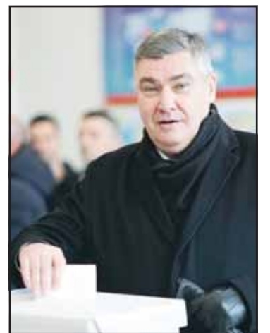
President incumbent Zoran Milanović casts his ballot during a runoff vote for the Croatian presidential election at a polling station in Zagreb, Croatia, Sunday, Jan. 12, 2025.

Milanović, 58, is an outspoken critic of Western military support for Ukraine in its war against Russia. He is the most popular politician in Croatia, and is sometimes compared to U.S. President-elect Donald Trump for his