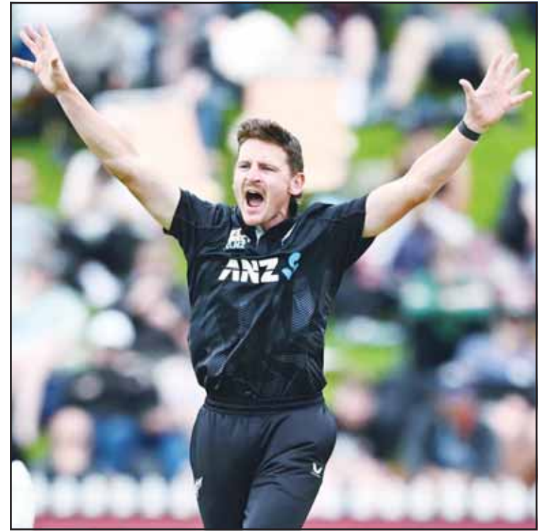
New Zealand's Nathan Smith appeals for the wicket of Sri Lanka's Charith Asalanka during the first ODI international cricket match between New Zealand and Sri Lanka at the Basin Reserve, Wellington, New Zealand. (AP)

Quickley's jumper tied the game at 109 with five minutes left, but Toronto missed four straight free throws to allow Detroit to take a 113-109 lead on Cunningham's short jumper with 3:48 to play.