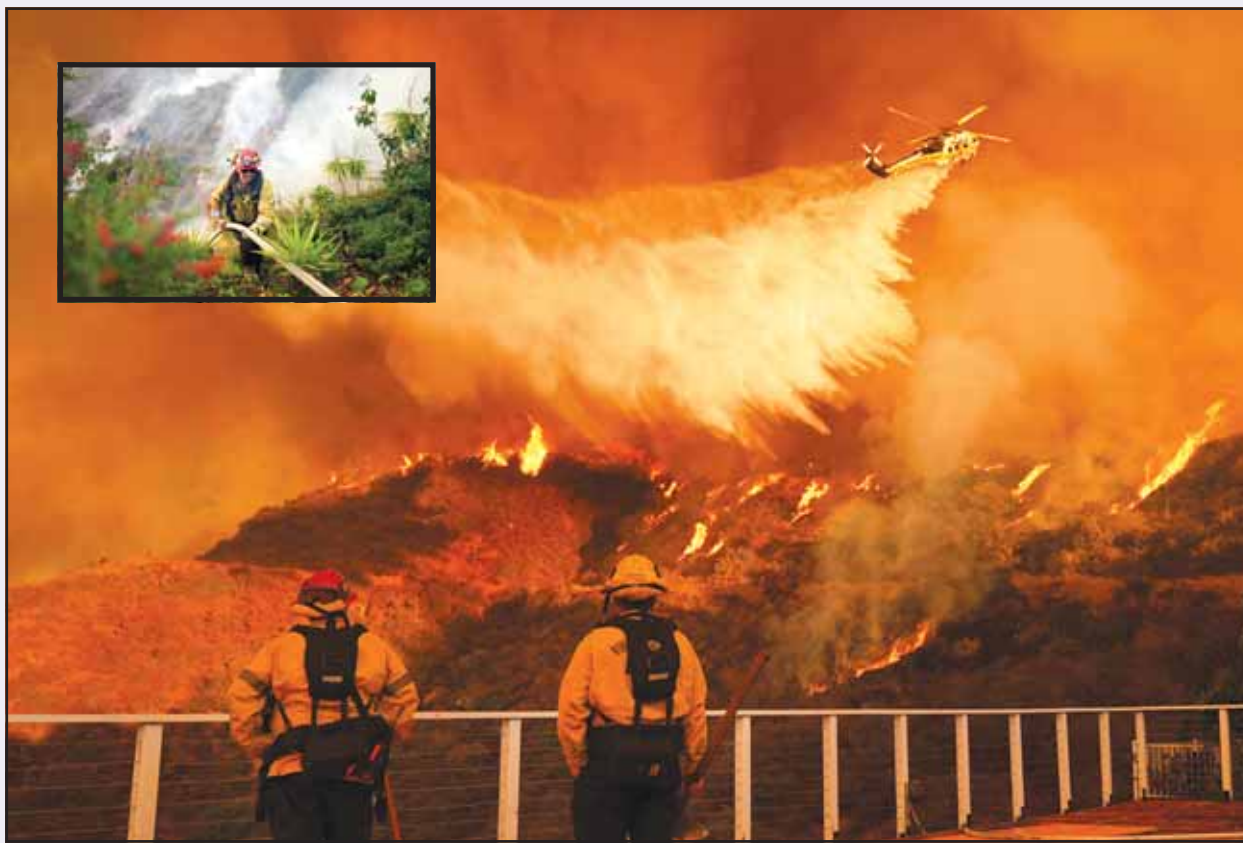
Firefighters watch as water is dropped on the Palisades Fire in Mandeville Canyon Saturday, Jan. 11, 2025, in Los Angeles. Inset: A firefighter sets up a hose while fighting the Palisades Fire in Mandeville Canyon on Saturday, Jan. 11, 2025, in Los Angeles.

A fierce battle occurred Saturday in Mandeville Canyon, home to Arnold Schwarzenegger and other celebrities not far from the Pacific coast, where swooping heli-