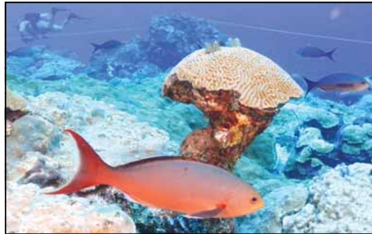
Fish swim around brain coral deep below ocean at the Flower Garden Banks National Marine Sanctuary in the Gulf of Mexico, Sept 16, 2023.

The "Care, Health, and Wellness" campaign aims to build on this momentum, promoting early detection and empowering the community with knowledge to combat cancer effectively.