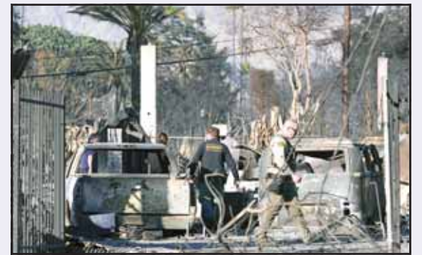
A medical examiner and sheriff's deputies check on a home destroyed by the Eaton Fire on Saturday, Jan. 11, 2025, in Altadena, Calif.