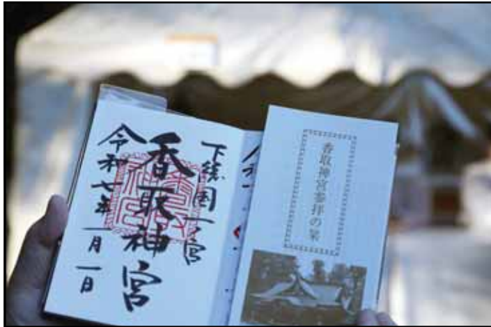
A Goshuin stamp at the Katori Shrine in Chiba Prefecture, Japan.