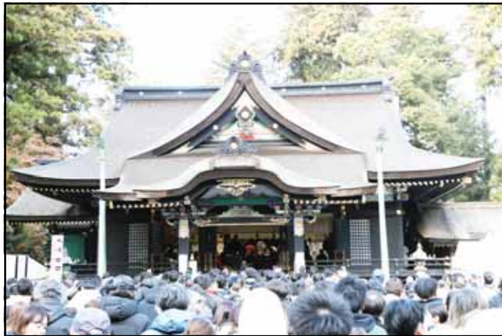
Japanese people visit a temple on New Year's Day.