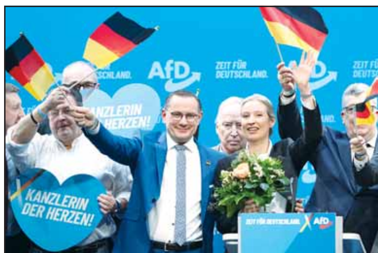
Tino Chrupalla, foreground center, AfD national chairman and parliamentary group leader of the AfD, and Alice Weidel, AfD national chairman, stand on stage at the AfD national party conference following Weidel's nomination as candidate for chancellor in the upcoming federal elections, in Riesa, Germany, Saturday, Jan. 11, 2025.

It is the mainstream conservative opposition Union bloc that leads polls