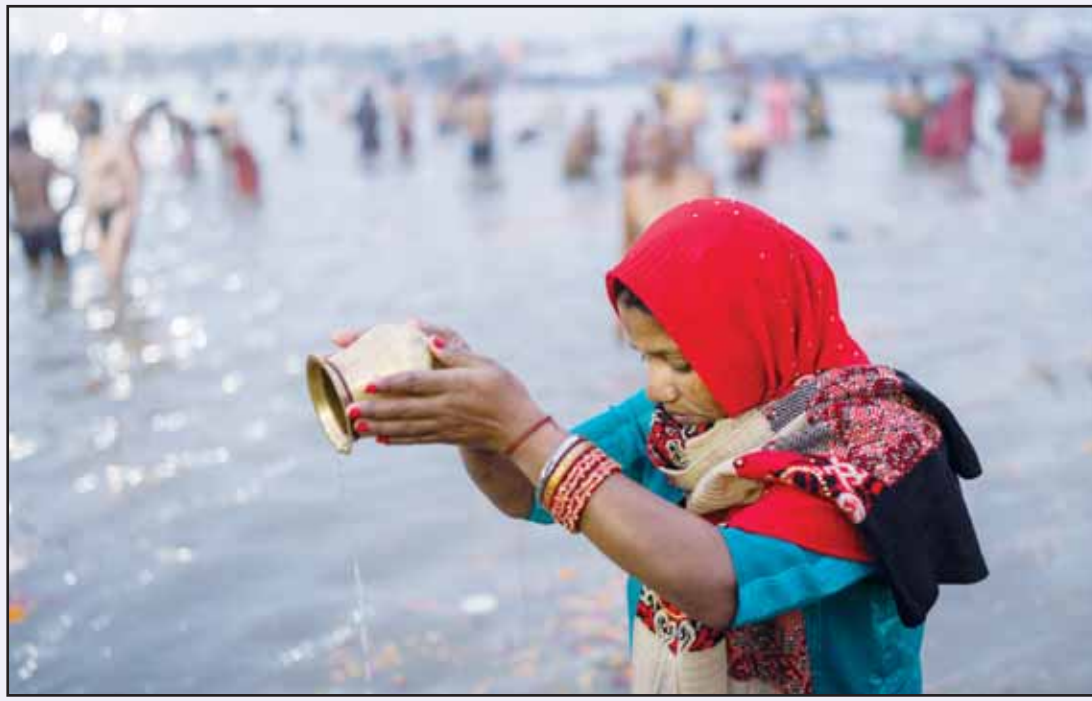
A Hindu devotee prays before taking a dip at the confluence of the Ganges, the Yamuna and the mythical Saraswati rivers on the first day of the 45-day-long Maha Kumbh festival in Prayagraj, India, Monday, Jan. 13, 2025.

The Kumbh rotates among these four pilgrimage sites about every three years on a date prescribed by astrology.