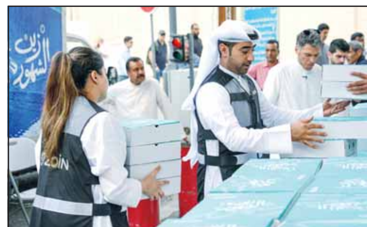
Zain's Ramadan campaign embodied the spirit of giving during the Holy Month.