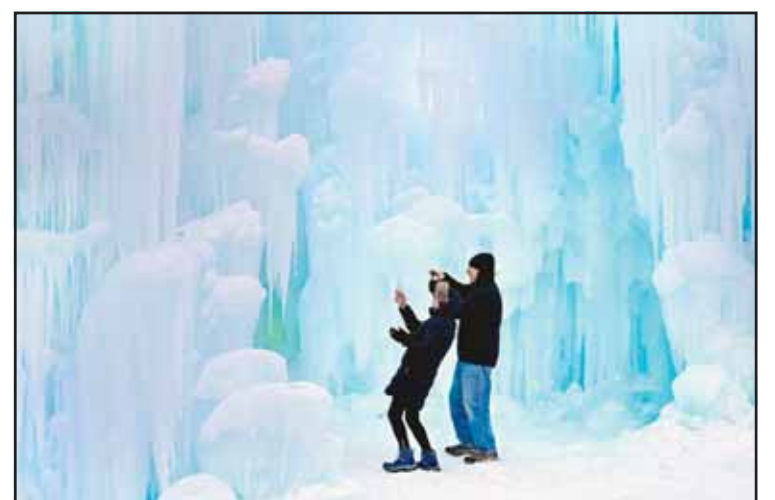
Nearly-made ice formations appear a glacial blue during daylight hours at the Ice Castles.