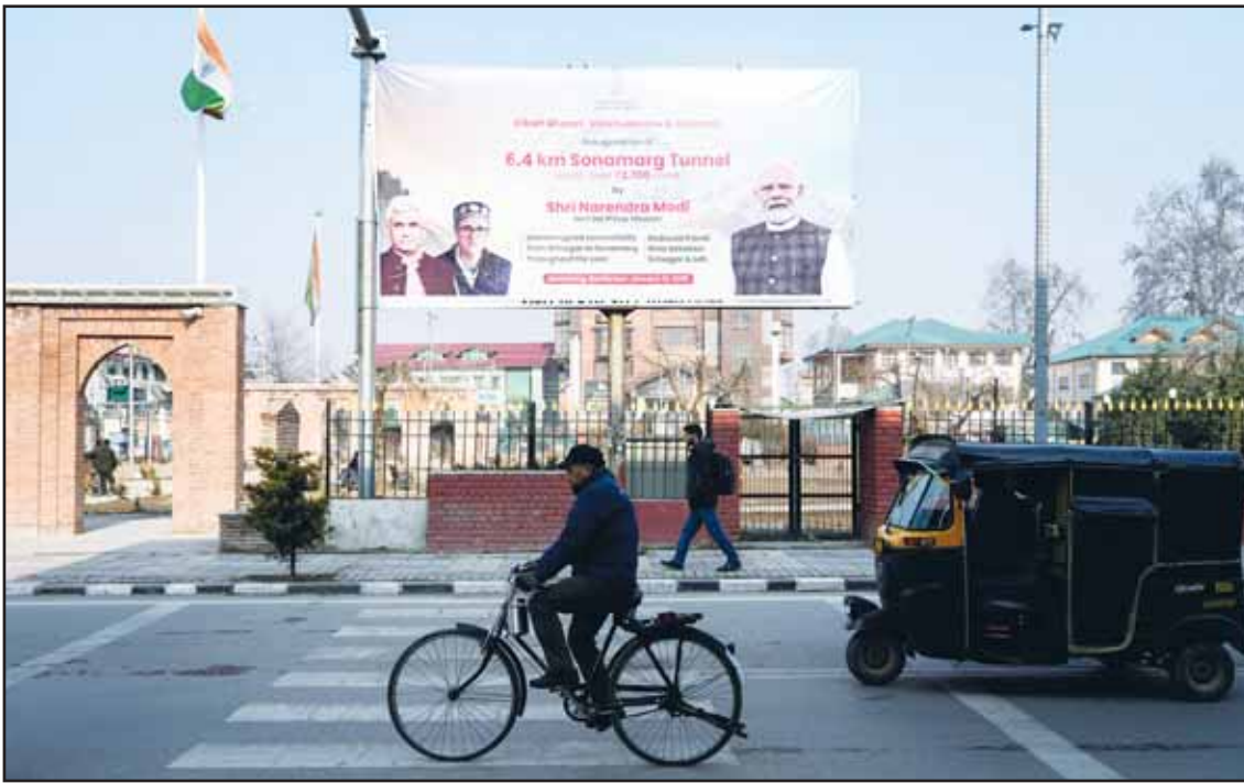
Traffic moves past a banner in Srinagar, welcoming the Indian Prime Minister Narendra Modi and other leaders to inaugurate a strategic tunnel project that connects Kashmir with Ladakh, Monday, Jan. 13, 2025.

Modi's government changed the city's Mughal-era name from Allahabad to Prayagraj as part of its Muslim-to-Hindu name-changing effort nationwide ahead of the 2019 festival and the national election that his party won. In 2021, his government refused to call off the festival in Haridwar despite a surge in coronavirus cases, fearing a backlash from religious leaders in the Hindu-majority country.