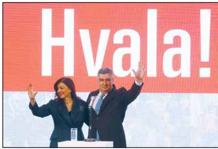
President incumbent Zoran Milanovic with his wife Sanja Music Milanovic greets his supporters as the preliminary results grant him victory in a runoff vote for the Croatian presidential election in Zagreb, Croatia, Sunday, Jan. 12, 2025. The sign reads "Thank You".

the first round of voting on Dec. 29, leaving Primorac, a forensic scientist who had unsuccessfully run for president previously, and six other candidates far behind.