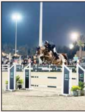
Participant attempts to clear a hurdle during the show jumping championship.

services to the attendees and reward its customers with exclusive offers in collaboration with "Caribou Coffee" and special discounts from "Atyab Al-Marshoud." This, in turn, allows customers to maximize their benefits while attending this sporting event.