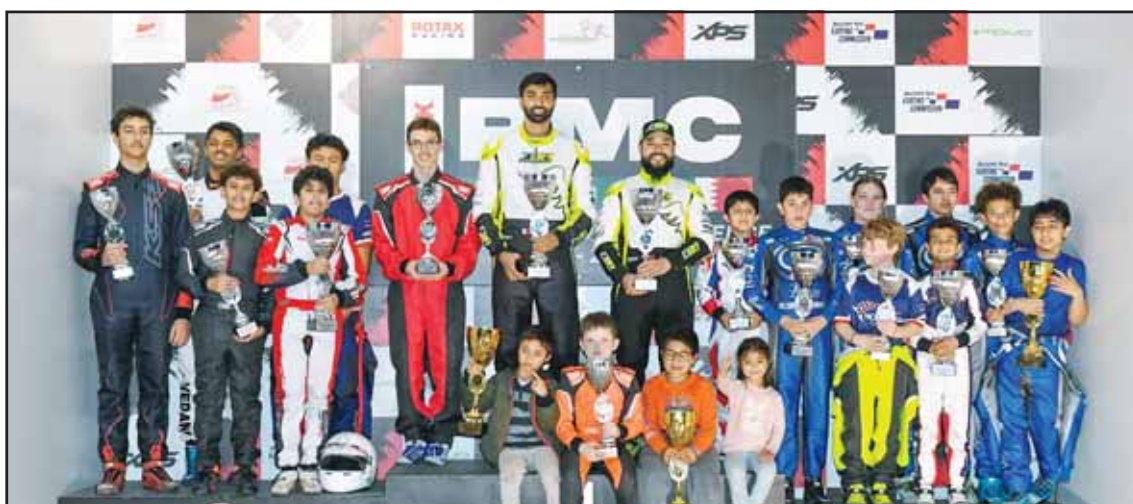
Winners on the podium.