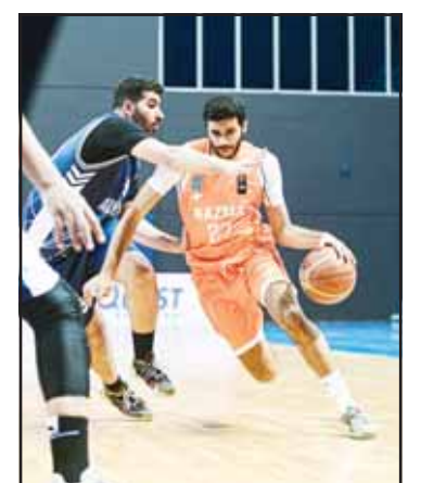
Kazma drives the ball past an opponent during the league match.

In other league news, Kazma delivered an overwhelming 134-52 victory over Yarmouk during the sixth round of the First Division League at Union Hall in Sheikh Saad Al-Abdullah Hall Complex,