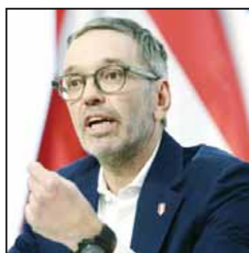
The leader of Austria's Freedom Party, Herbert Kickl, addresses a news conference in Vienna, Austria, on Jan 7, 2025.

Kickl said that would be achieved without new taxes, "with measures against tax loopholes and privileges,