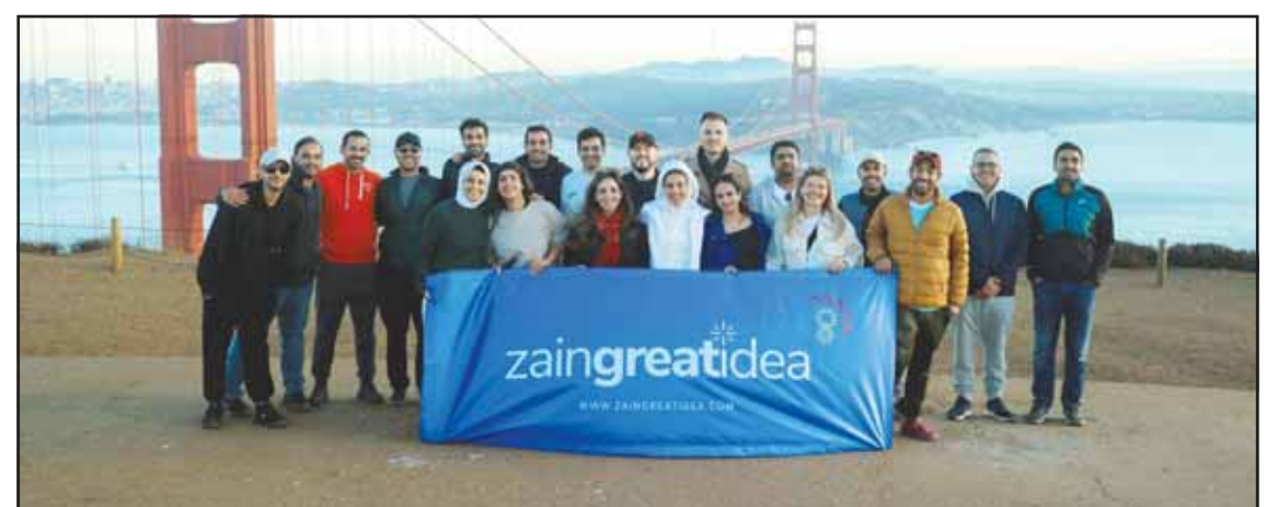
Zain Great Idea entrepreneurs in San Francisco.