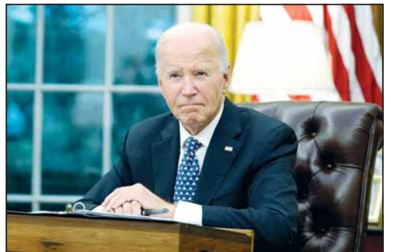
President Joe Biden speaks from the Oval Office of the White House in Washington, Sept. 30, 2024.

On the call Sunday, Biden told the families that his administration would