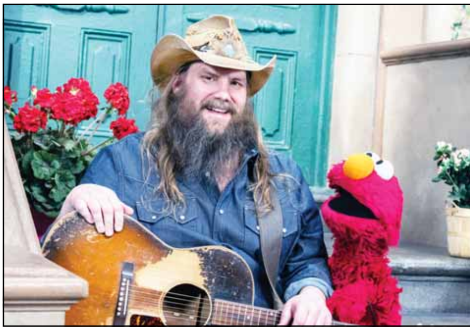
Singer-songwriter Chris Stapleton, (left), with muppet character Elmo on the set of 'Sesame Street.'