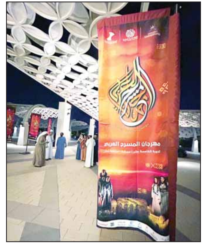
Arab Theater Festival activities.

Al-Ansari stressed the importance of organizing such artistic and cultural festivals to explore diverse theatrical experiences, provide ample opportunities for the development of theatrical creativity, and encourage the exchange of ideas and perspectives between Arab and international theater practitioners.