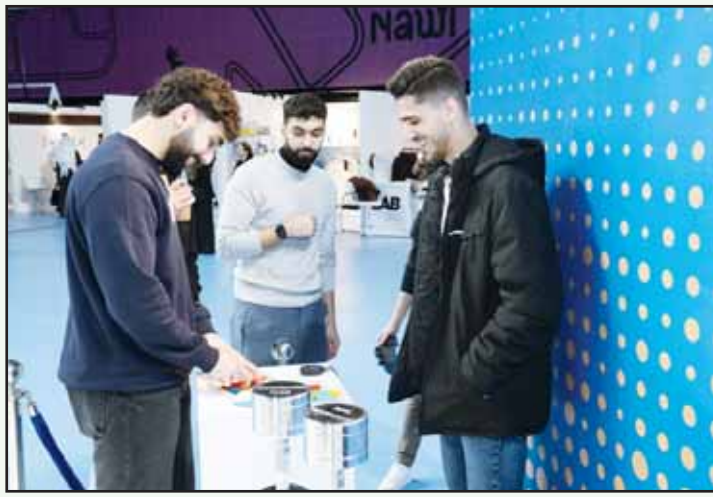
Snapshots of visitors participating in various activities at Burgan's dedicated booth.

On their part, the NAWI team expressed their gratitude to Burgan Bank for their unwavering support, saying: "Having many great options to choose from denotes the vivaciousness of any industry; however, it can be daunting for consumers to decide where to start or what choices to opt for. As the name suggests, NAWI was designed for everyone with a sincere intention to lead a life of balance and wellness. Thanks to our sponsors, especially Burgan Bank, and their earnest support, we were able to deliver an expo that is both holistic and wholesome, offering all