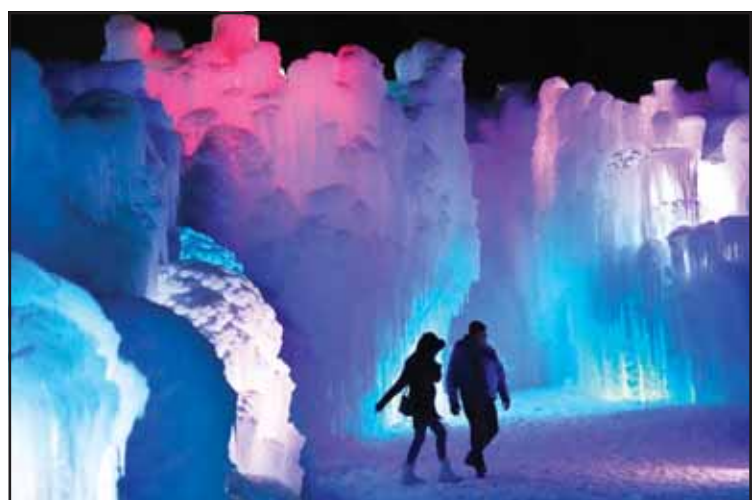
Colorful lights shine inside the walls of ice at Ice Castles, Jan. 10, 2025, in North Woodstock, N.H.

1. "Den of Thieves 2: Pantera," $15.5 million; 2. "Mufasa: The Lion King," $13.2 million; 3. "Sonic the Hedgehog 3," $11 million; 4. "Nosferatu," $6.8 million; 5. "Moana 2," $6.5 million; 6. "A Complete Unknown," $5 million; 7. "Wicked," $5 million; 8. "Babygirl," $3.1 million; 9. "Game Changer," $1.9 million and 10. "The Last Showgirl," $1.5 million.