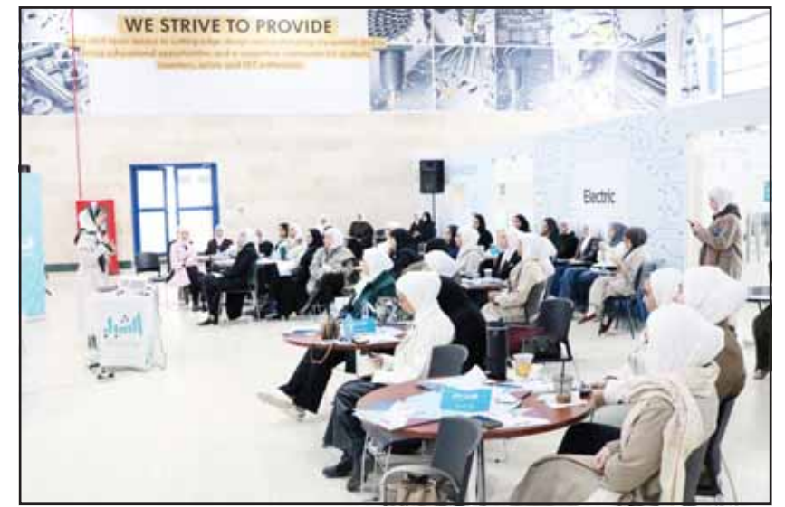
Second working session of the program.

They also suggested that the electronic contract should be applied in two phases: the first phase involves signing a paper contract between the parties before obtaining the property description certificate to link the sale, while the second phase would utilize the electronic contract.