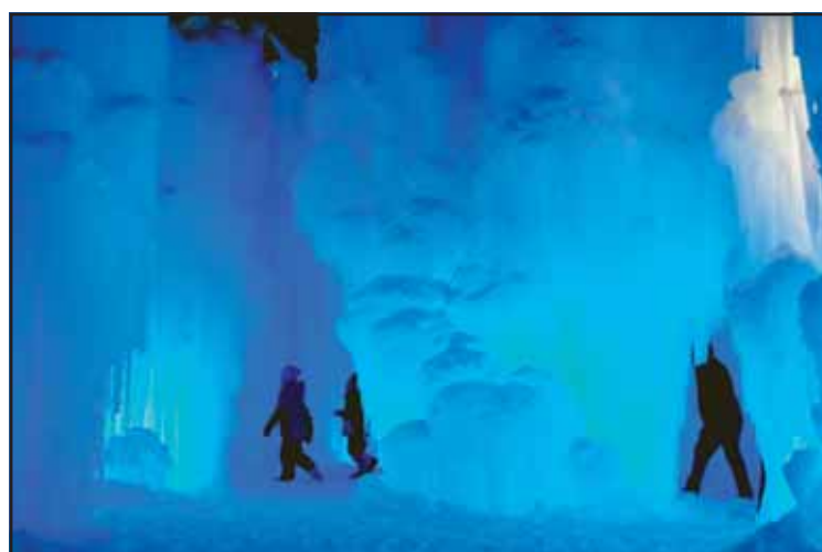
Youngsters explore caves at Ice Castles.