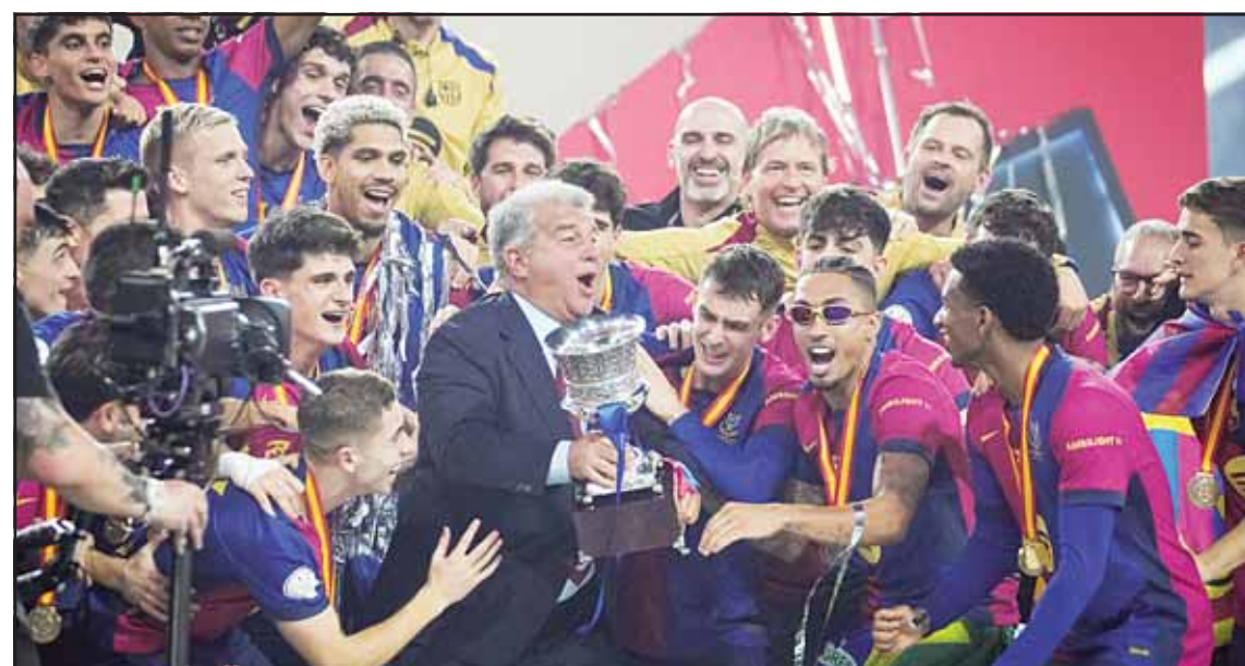
President of Barcelona Joan Laporta, centre, and his players celebrate with the trophy after winning the Spanish Super Cup against Real Madrid at King Abdullah Stadium in Jeddah, Saudi Arabia.

But it was Barcelona's night and that was clear one minute later when Raphinha made it 5-1 with a calm finish.