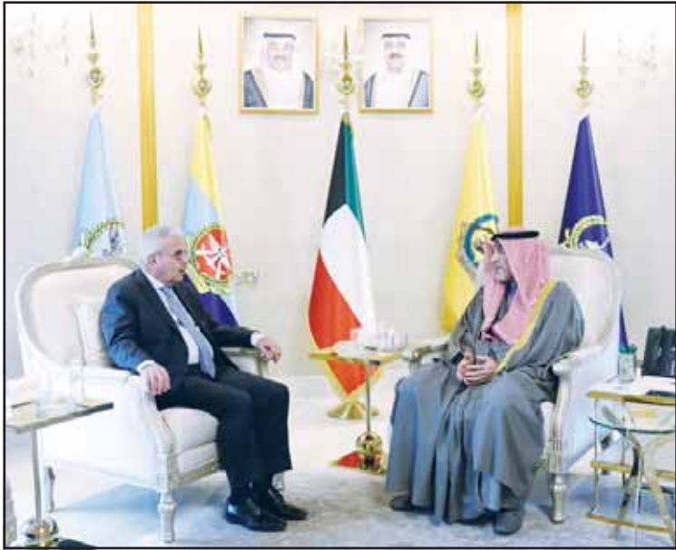
First Deputy Prime Minister, Defense Minister and Interior Minister Sheikh Fahad Yousef Al-Sabah receives Palestinian Ambassador in Kuwait Rami Tahboub.