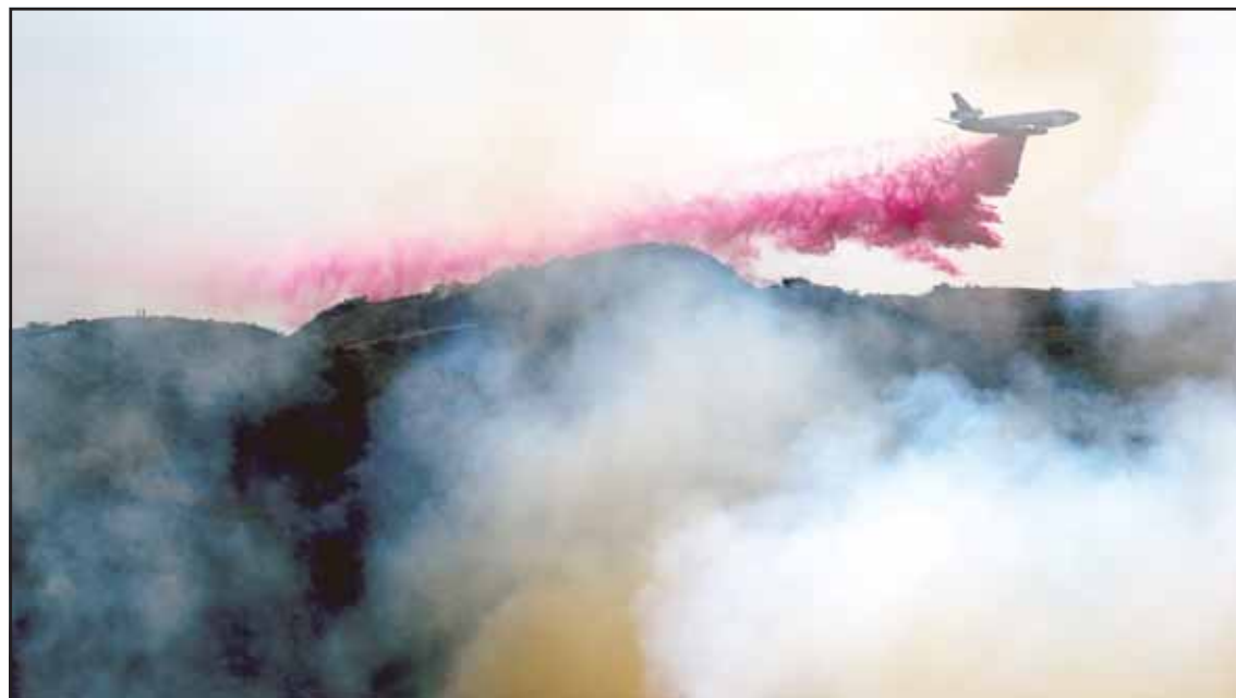
Retardant is dropped by air tanker on the Palisades Fire in the outskirts of the Pacific Palisades neighborhood of Los Angeles, Friday, Jan. 10, 2025.

Meanwhile, the death toll rose to 24 over the weekend.