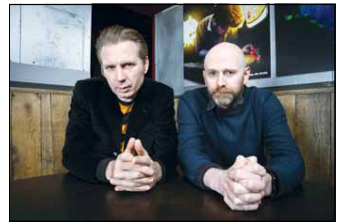
Alex Kapranos, (left), and Bob Hardy of Franz Ferdinand pose, Thursday, Nov. 28, 2024, in London.