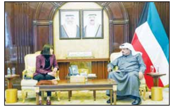
His Highness the Prime Minister receives US Ambassador to Kuwait.