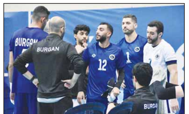
Burgan heads to Doha.