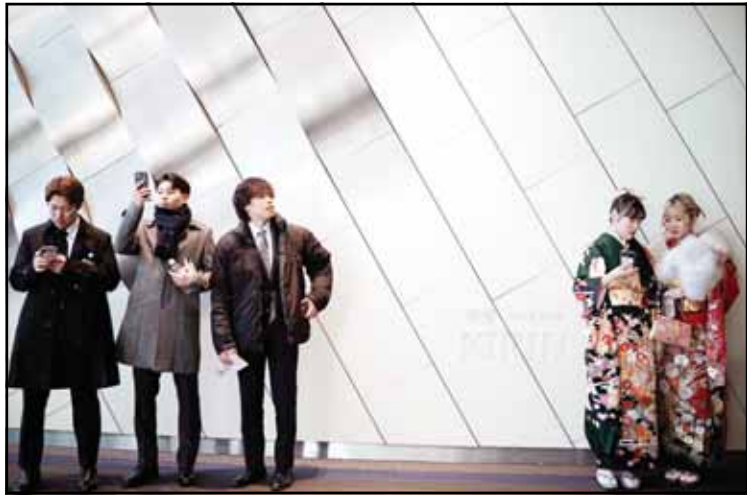
Men wearing suits and women wearing kimono arrive for the Coming-of-Age Day celebration, in Yokohama near Tokyo, Monday, Jan. 13.