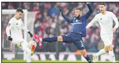
Manchester United's Noussair Mazraoui, center, challenges for the ball with Arsenal's Gabriel Martinelli, left, during the English FA Cup soccer match between Arsenal and Manchester United at the Emirates stadium in London. Zirkzee converted the clinching penalty as United beat Arsenal 5-3 in a shootout in the third round of the FA Cup.