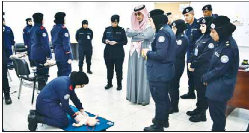
First Deputy Prime Minister, Minister of Defense and Minister of Interior Sheikh Fahad Yousef Saud Al-Sabah observes the first aid training provided by women in uniform.