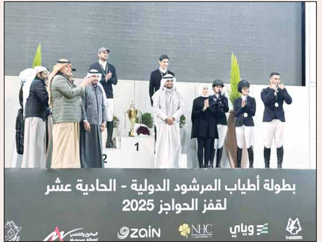
Group photo of show jumping championship winners and officials.

Weyay is Kuwait's first digital bank, aiming to simplify banking through an advanced digital platform and offering its customers a seamless and secure experience via the Bank's mobile app. Through its continuous focus on empowering the youth, Weyay Bank offers banking products that help the younger generation stay aligned with the digital age we live in.