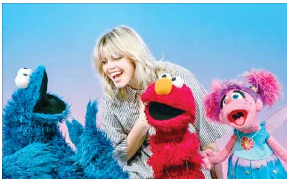
Actor-singer Renee Rapp with muppet characters Cookie Monster, (from left), Elmo and Abby Cadabby on the set of 'Sesame Street.'

NEW YORK, Jan. 13, — Appearing on "Sesame Street"? That's the best idea.