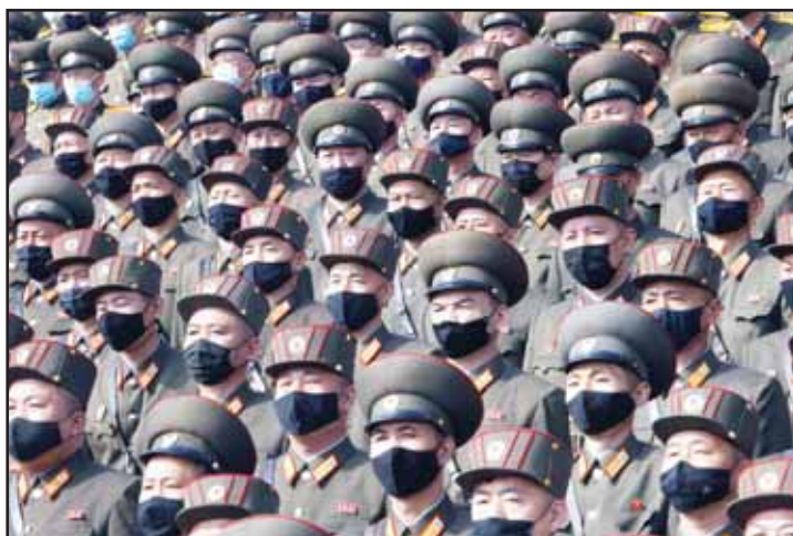
Soldiers wearing face masks to help curb the spread of the coronavirus rally to welcome the 8th Congress of the Workers' Party of Korea at Kim Il Sung Square in Pyongyang, North Korea, on Oct. 12, 2020.

The land where MST farmers have been working for 20 years is home to 45 families, who produce food in the area.