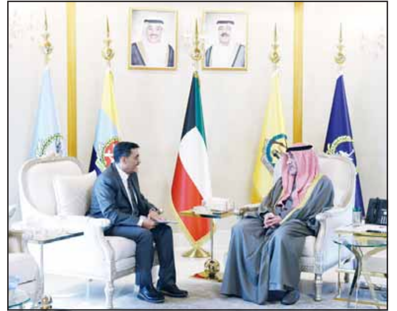
First Deputy Prime Minister, Defense Minister and Interior Minister Sheikh Fahad Yousef Al-Sabah receives Yemeni Ambassador in Kuwait Ali bin Safaa.