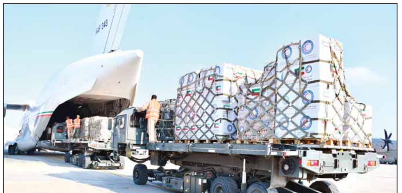
33 tons of aid and medical supplies being loaded onto the second relief flight bound for Syria, as part of Kuwait's humanitarian campaign - 'Kuwait By Your Side.'