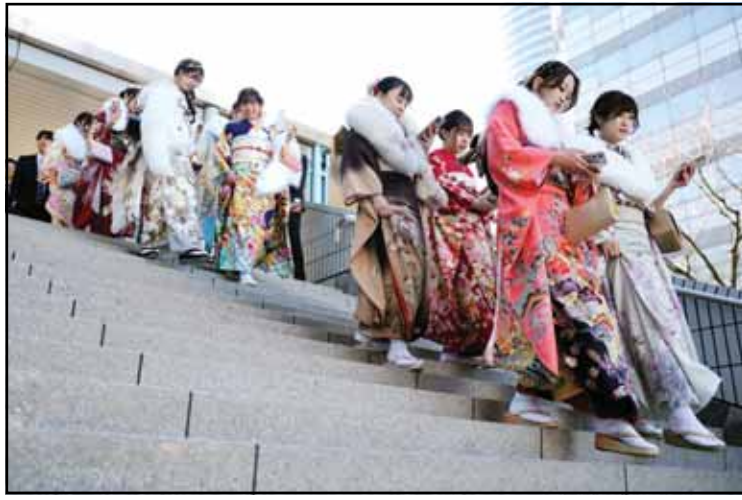
Kimono-clad women walk to the venue of a ceremony to celebrate the Coming-of-Age Day.