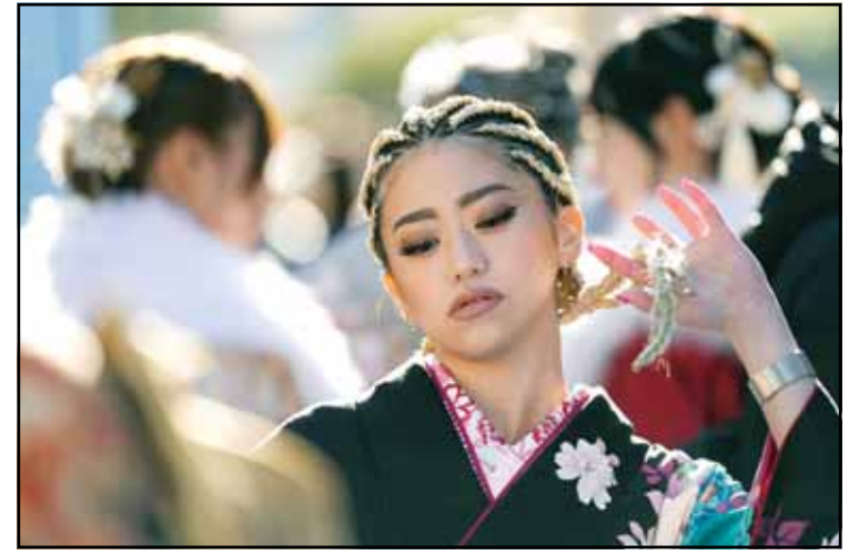
A kimono-clad woman celebrates the Coming-of-Age Day, a centuries-old tradition and national holiday celebrating the milestone from child to adult, in Yokohama near Tokyo, Jan. 13.