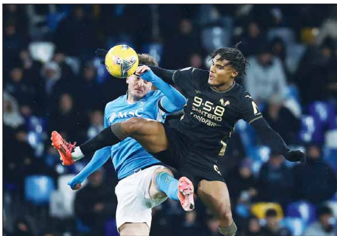
Napoli's Amir Rrahmani, left, fights for the ball with Verona's Amin Sarr, during the Serie A soccer match between Napoli and Verona at the Diego Armando Maradona Stadium in Naples, Italy.

He made up for it in the 61st minute with a spectacular goal as he cut inside from the right, played a one-two with Lukaku and then drove the ball powerfully into the near side of the net from outside the area.