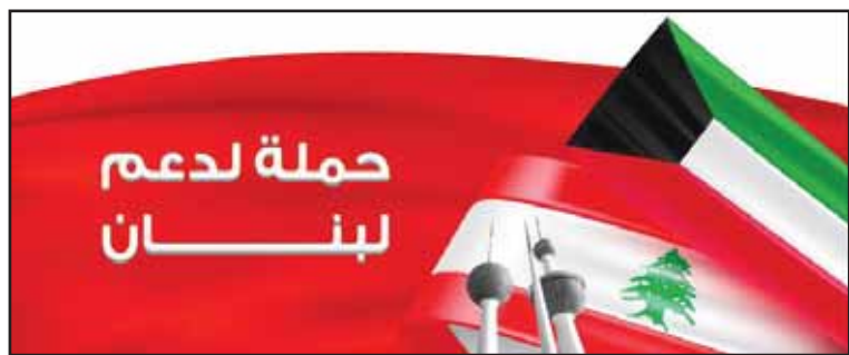
Ali Abdulwahab Al Mutawa Commercial Co. supports the 'Kuwait Wishes You Well' campaign

The Bank has continuously improved its performance over the years, through an expanded revenue structure, diversified funding sources, and a strong capital base. The adoption of state-of-the-art services and technology has positioned it as a trendsetter in the domestic market and within the MENA region. Moreover, Burgan Bank's brand has been built on a foundation of real values – trust, commitment, excellence, and progression – which serve as a reminder of the high standards to which the Bank always aspires. In fact, the Bank's core philosophy of 'Driven by You' is the foundation on which its products and services are continuously developed.