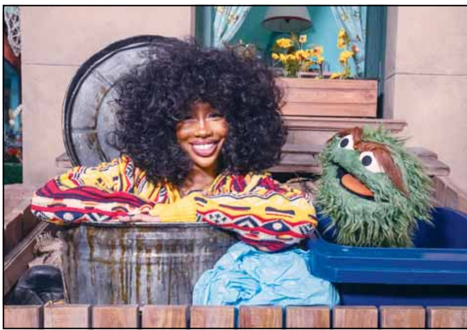
This image released by Sesame Workshop shows singer SZA, (left), with muppet character Oscar the Grouch on the set of 'Sesame Street.' (AP)