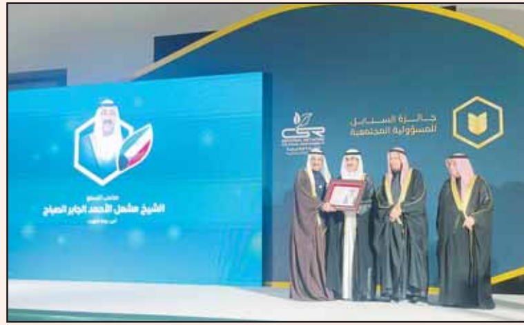
Ambassador of the State of Kuwait to the Kingdom of Bahrain receives the award on behalf of His Highness the Amir.

MANAMA, Jan 13, (KUNA): Bahrain's Al-Sanabel Orphan Care Society selected on Sunday His Highness the Amir Sheikh Meshal Al-Ahmad Al-Jaber Al-Sabah as the "Honorary Gulf Leadership Personality" for 2024.