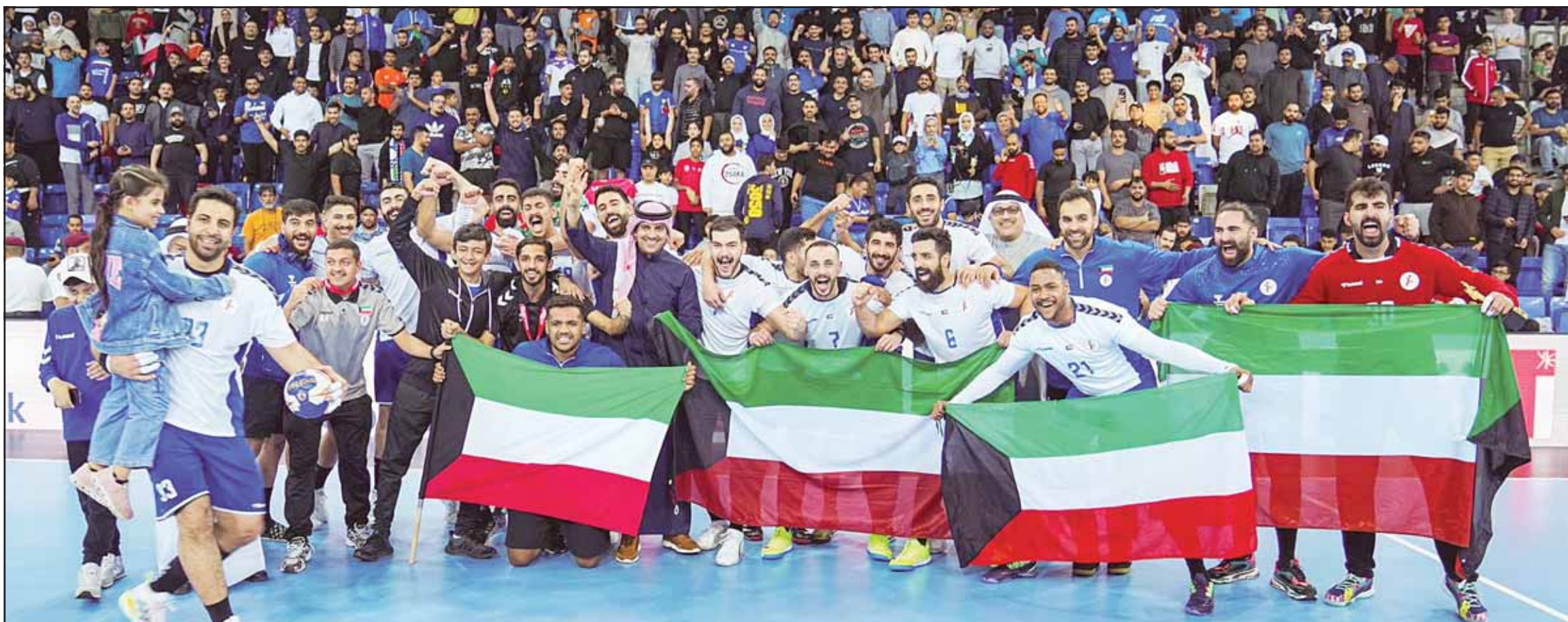
In this file photo, Kuwait players celebrate after qualifying for the World Cup.