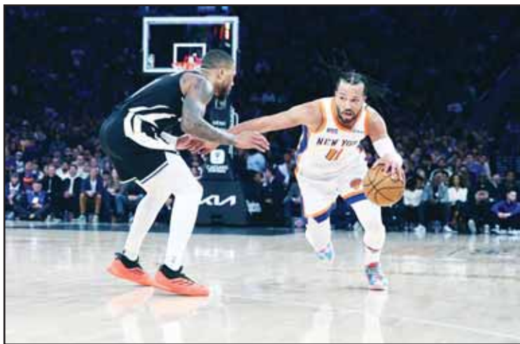
New York Knicks' Jalen Brunson, right, dribbles against Milwaukee Bucks' Damian Lillard, left, during the first half of an NBA basketball game Sunday, Jan. 12, 2025, in New York.