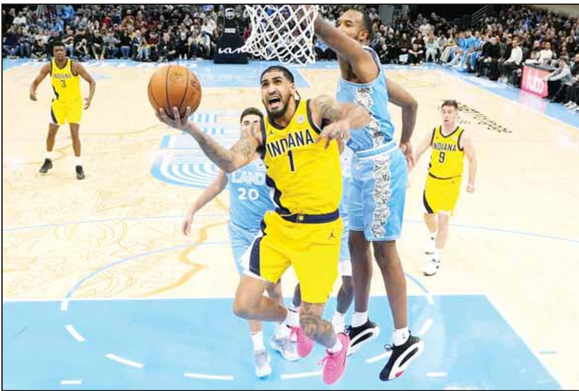
Indiana Pacers forward Obi Toppin (1) goes to the basket in front of Cleveland Cavaliers forward Evan Mobley (4) in the second half of an NBA basketball game in Cleveland.