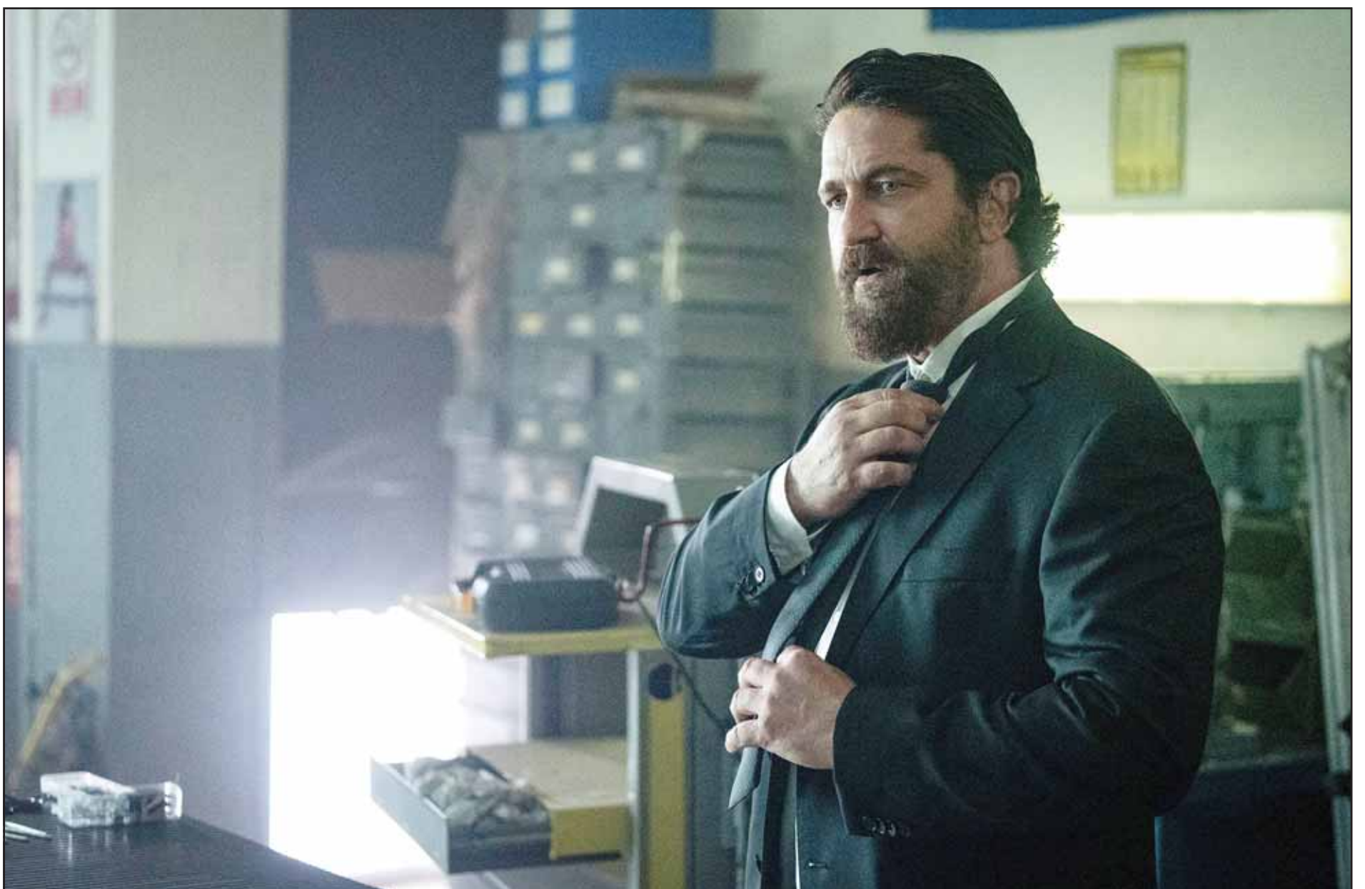
This image released by Lionsgate shows Gerard Butler in a scene from 'Den of Thieves 2: Pantera.'