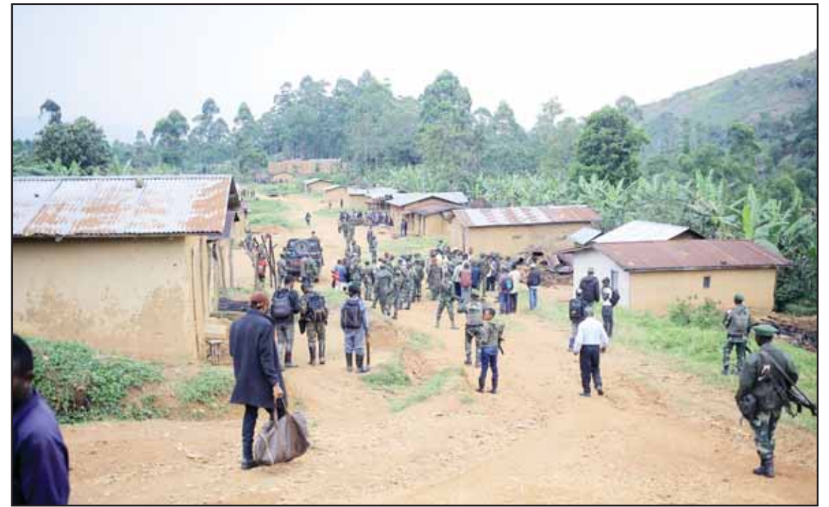
Democratic Republic of Congo Defence Forces gather in the North Kivu province village of Mukondi, on March 9, 2023.

In October, gunmen fatally shot at least seven people working on the tunnel project and injured at least five others. Police blamed insurgents fighting for decades against Indian rule in the region.