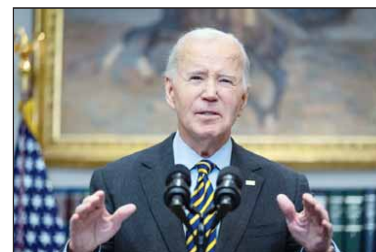
US President Joe Biden speaks in the Roosevelt Room at the White House in Washington, Friday, Jan. 10, 2025.

White House national security adviser Jake Sullivan stressed that the framework would ensure that the most cutting-edge aspects of AI would be developed within the United States and with its closest allies, instead of possibly getting offshored such as the battery and renewable