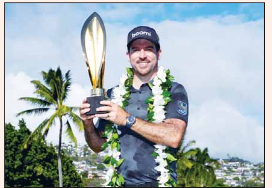
Nick Taylor, of Canada, poses with his trophy after winning the Sony Open golf event at Waialae Country Club in Honolulu.