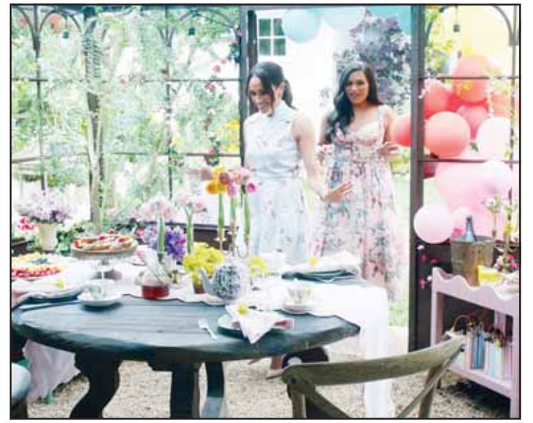
This image released by Netflix shows Meghan, Duchess of Sussex, and Mindy Kaling in a scene from her series 'With Love, Meghan.'

Born in Austria, Schoenberg moved to the U.S. when the Nazis took power and settled in Los Angeles, where he died in 1951.