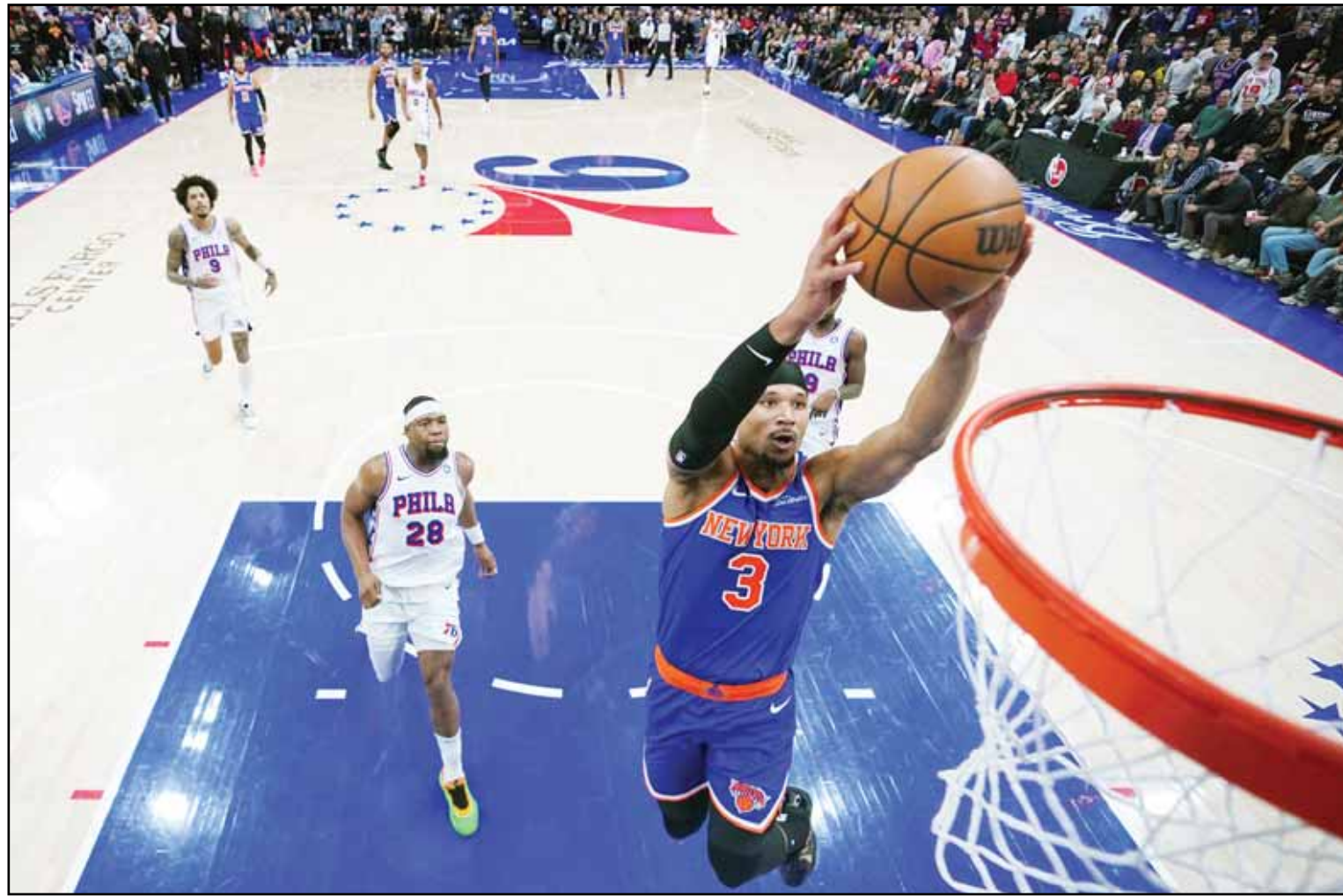
New York Knicks' Josh Hart (3) goes up for a dunk during the second half of an NBA basketball game against the Philadelphia 76ers in Philadelphia.

LaMelo Ball added 27 points, nine assists and three blocks to help Charlotte snap a seven-game road losing streak. Miles Bridges had 25 points and 10 rebounds, and Brandon Miller finished with 20 points.