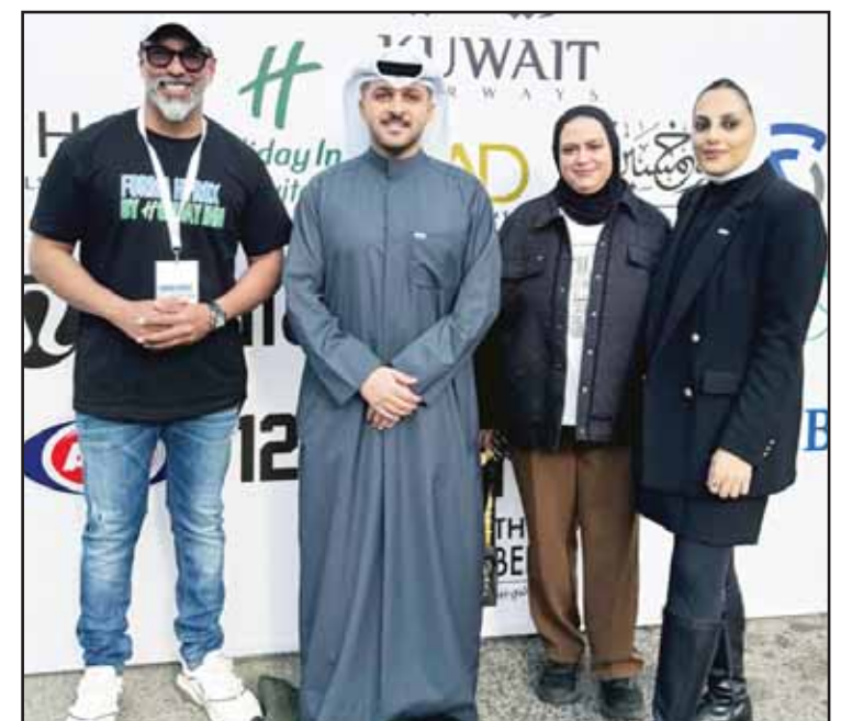
KIB's FORMA HYROX fitness competition.

Kuwait International Bank (KIB) is a bank that operates according to the Islamic Shari'ah, based in the State of Kuwait. Incorporated in 1973, and originally known as Kuwait Real Estate Bank, KIB made the transition to its current Islamic operating model in 2007. In 2018, KIB embarked on a new phase of its journey full of innovation and development. As part of its new strategic direction, the Bank focuses on offering a next-level customer experience under the slogan: "Bank for Life".