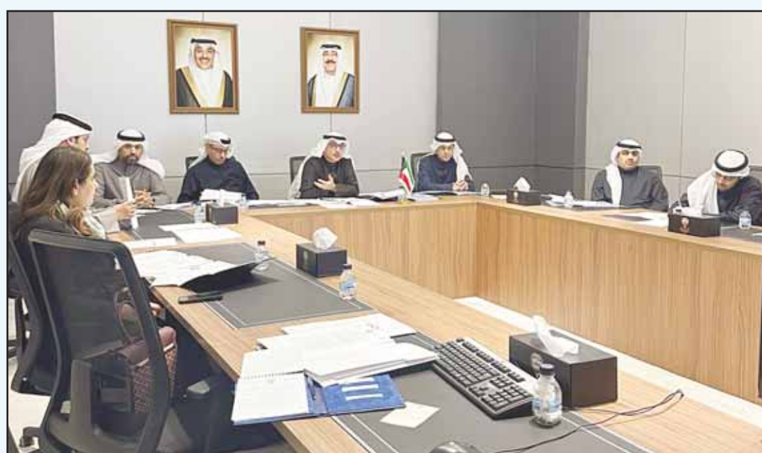
Assistant Foreign Minister for GCC Affairs Ambassador Najib Al-Badr during the virtual meeting that grouped officials from GCC countries' foreign affairs departments.

KUWAIT CITY, Jan 16, (KUNA): The assistant foreign minister for GCC affairs Ambassador Najib Al-Badr headed on Thursday a virtual meeting that grouped officials from GCC countries' foreign affairs departments, dedicated for examining conditions in Syria.