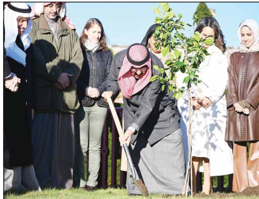
His Highness the Kuwaiti Amir plants a tree at the Dumfries House.