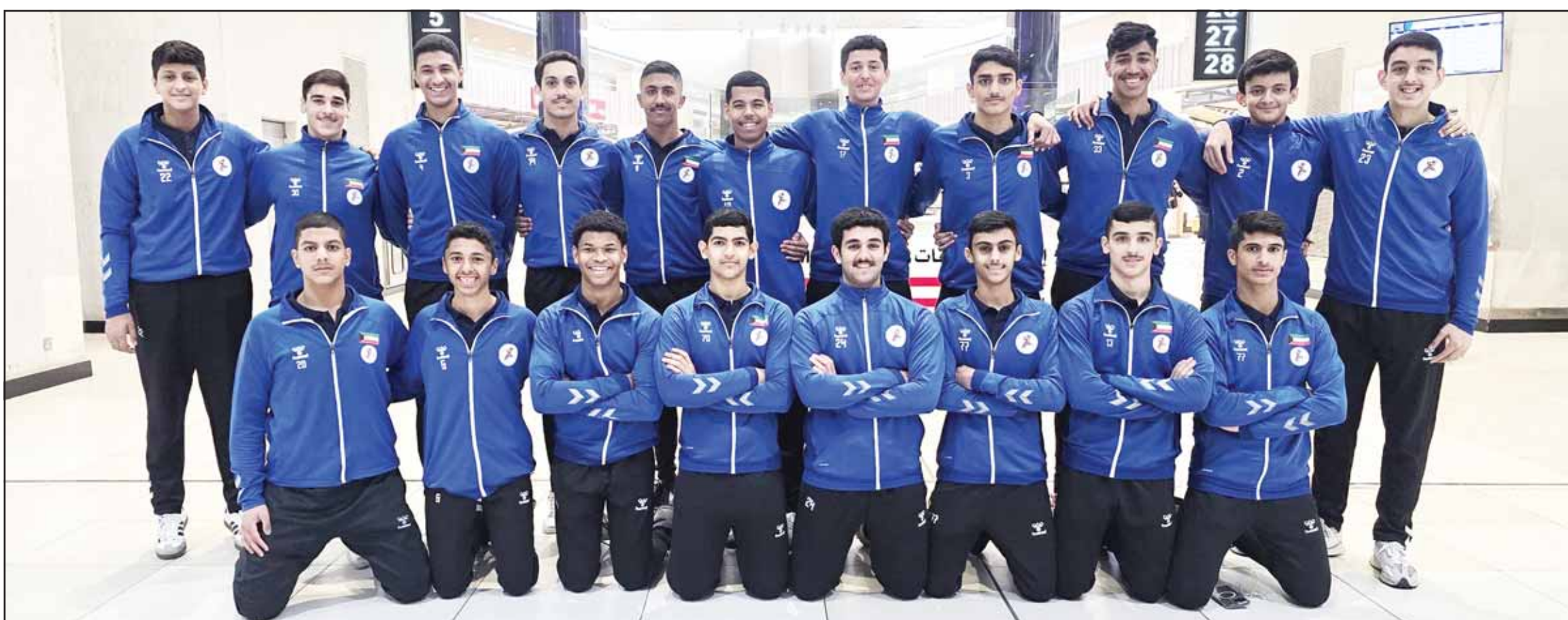
Kuwait junior handball team.