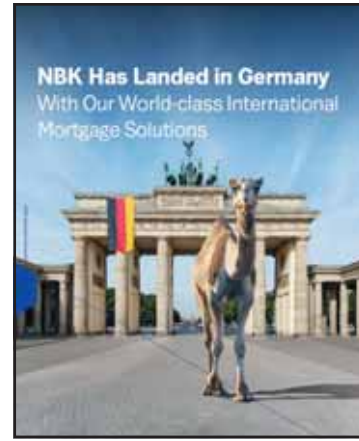
A flyer announcing the launch.

them to own properties in key financial and business hubs around the world,