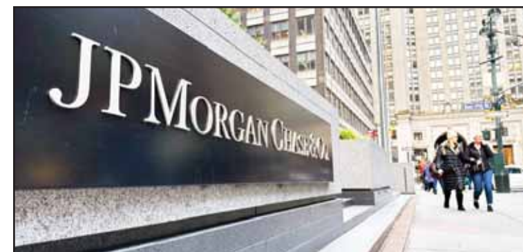
Pedestrians approach JPMorgan Chase headquarters, Wednesday, Dec. 29, 2023, in New York.

As great as 2024 was for markets, bank stocks did even better, despite the Federal Reserve trimming its benchmark interest rate three times between September and December.