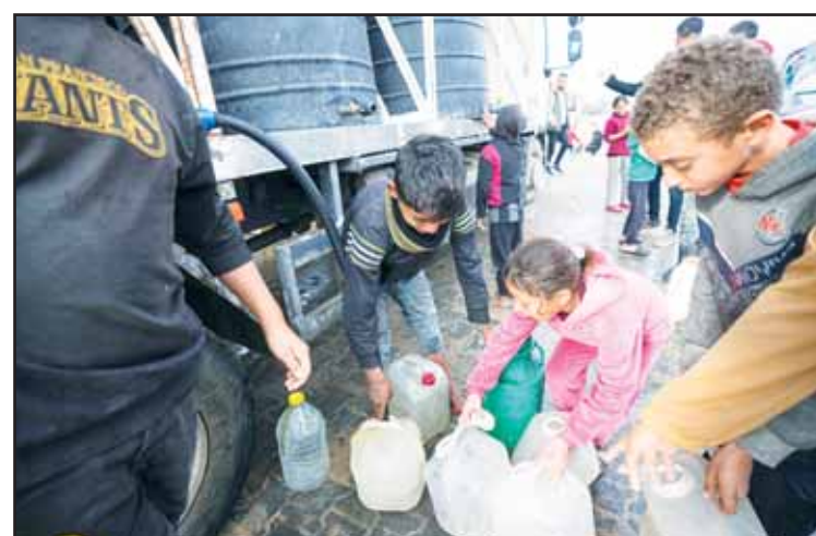
Children collect water from a truck at a tent camp for displaced Palestinians in Deir al-Balah, central Gaza Strip, Jan. 16, 2025.