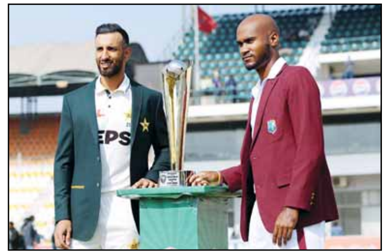
West Indies captain Kraigg Brathwaite, right, and his Pakistani counterpart Shan Masood pose for photo with test-series trophy, in Multan, Pakistan.

Multan will also host the second test, starting from Jan. 25 due to ongoing upgrades at Pakistan's two main stadiums in Karachi and Lahore for next month's Champions Trophy.