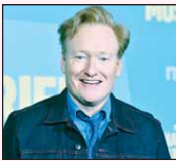
Conan O'Brien arrives at a photo call for 'Conan O'Brien Must Go', April 16, 2024, at Avalon Hollywood in Los Angeles.

from near-total obscurity in 1993, when he was chosen to replace the legendary David Letterman as host of "Late Night" despite no significant on-camera experience. The former Harvard Lampoon editor had spent the previous years as