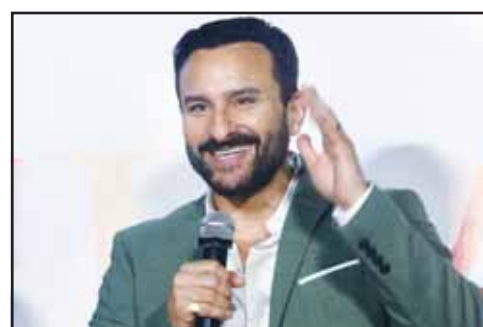
Bollywood actor Saif Ali Khan attends the trailer launch of his film Tanhaji in Mumbai, India, Nov. 19, 2019.

Indian media quoted police as saying the intruder barged into the house at about 2:30 a.m. and fled after stabbing Khan. A female employee at Khan's home was also injured during the attack and was