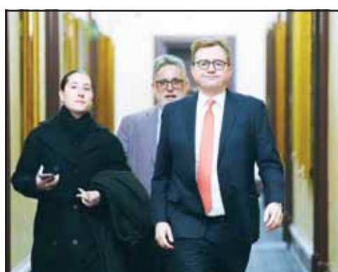
Canadian Minister of Energy and Natural Resources Jonathan Wilkinson arrives for a Liberal caucus meeting in Ottawa on Wednesday, Jan. 8, 2025.

Trump has threatened to impose sweeping 25% tariffs on Canada as well as on Mexico. He's also threatened tariffs on China and Europe, creating a