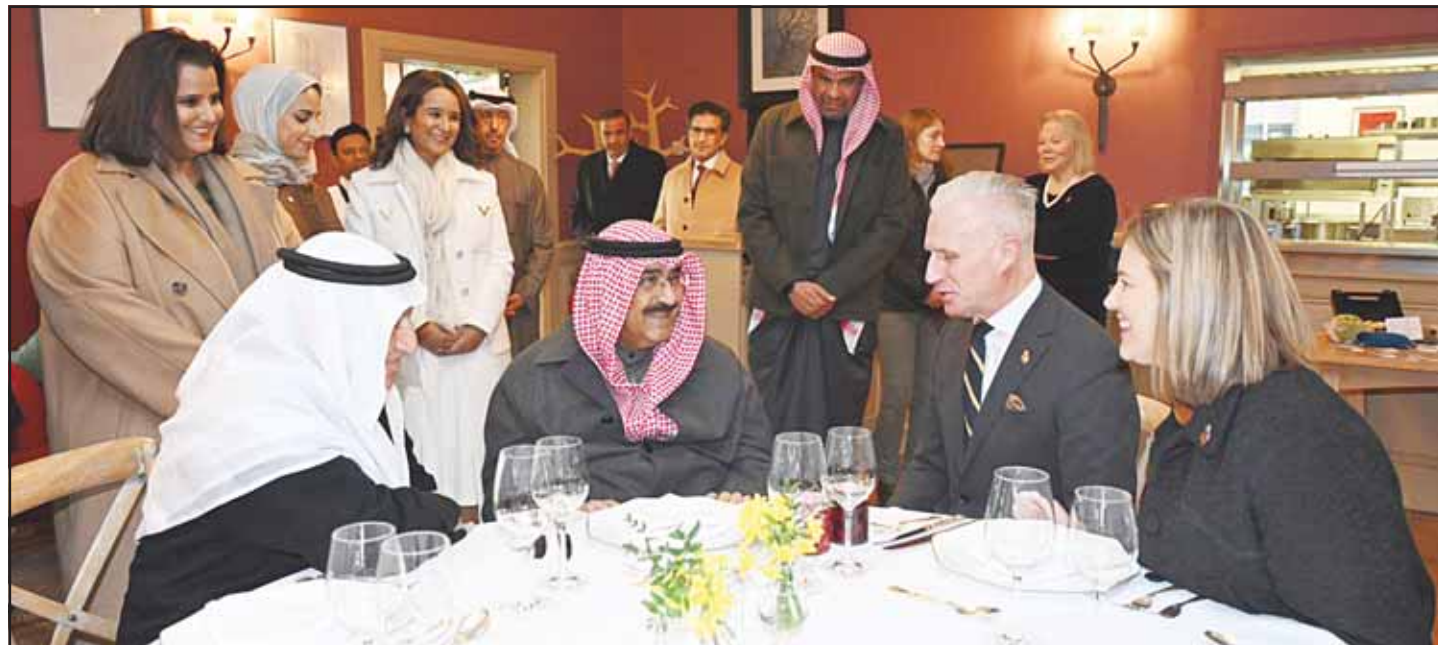
His Highness the Kuwaiti Amir exchanges pleasantries with dignitaries.