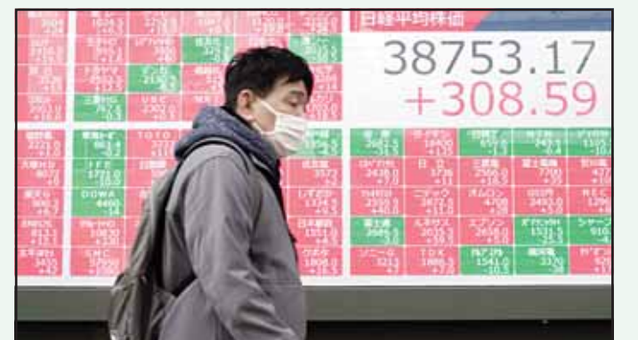
A person walks in front of an electronic stock board showing Japan's Nikkei index at a securities firm Thursday, Jan. 16, 2025, in Tokyo.

Few traders expect Wednesday's data to convince the Fed to cut its main interest rate at its meeting later this month, as it's done at three straight meetings since September. But economists and analysts say it could open the door for cuts later in the year, maybe even in March, if more data comes in to show that upward pressure on inflation is abating.