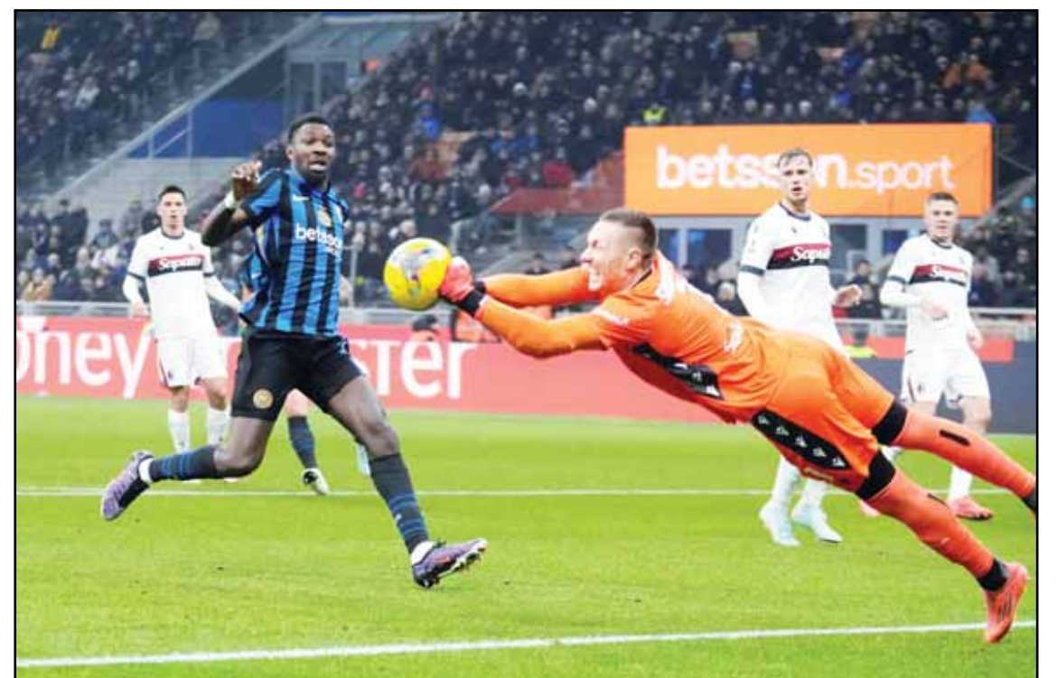
Bologna's goalkeeper Lukasz Skorupski, right, saves the ball from Inter Milan's Marcus Thuram, during a Serie A soccer match between Inter Milan and Bologna the San Siro stadium in Milan, Italy.