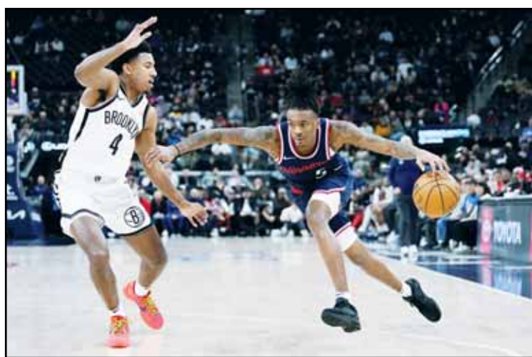
Los Angeles Clippers guard Bones Hyland, right, tries to drive by Brooklyn Nets guard Reece Beekman during the second half of an NBA basketball game in Inglewood, Calif.

After Gary Payton II stepped out in a backcourt trap, DiVincenzo took an easy layup to cut the lead to 113-112