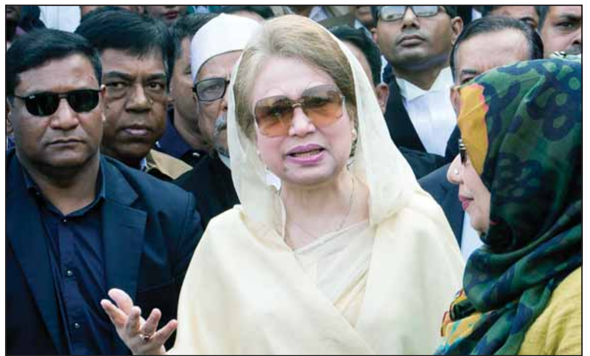
Bangladesh's former prime minister and Bangladesh Nationalist Party (BNP) chairperson Khaleda Zia, center, leaves after a court appearance in Dhaka, Bangladesh on Dec. 28, 2017.

In July 2021, thousands of Cubans took to the streets to protest widespread power outages and shortages amid a severe economic crisis. The government's crackdown on the demonstrators, which included arrests and detentions, sparked international criticism, while Cuban officials blamed U.S. sanctions and a media campaign for the unrest.