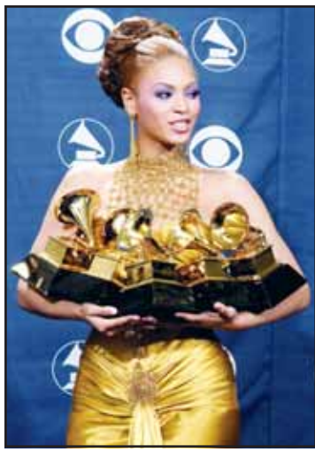
Beyoncé Knowles holds the Grammy awards she won during the 46th Annual Grammy Awards on Feb. 8, 2004, in Los Angeles.

The Grammys can also be watched through live TV streaming services that include CBS in their lineup, like