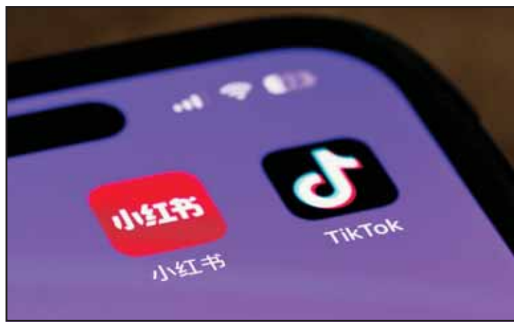
Icons for the smartphone apps Xiaohongshu and TikTok are seen on a smartphone screen in Beijing, Tuesday, Jan. 14, 2025.

Attorneys for the TikTok and ByteDance have claimed it's impos-