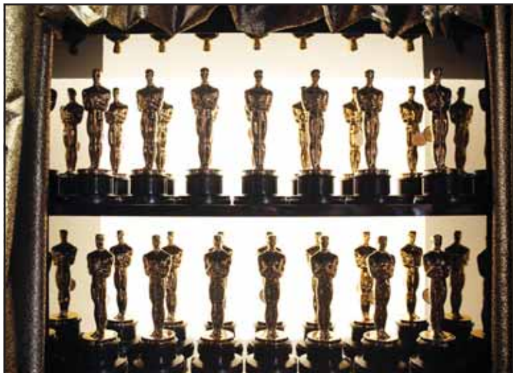
Oscar statuettes appear backstage at the Oscars at the Dolby Theatre in Los Angeles on Feb. 28, 2016.

He won multiple awards for his roles in Hindi cinema, including seven Filmfare Awards. In 2010, he received the Padma Shri, the fourth highest Indian civilian award.