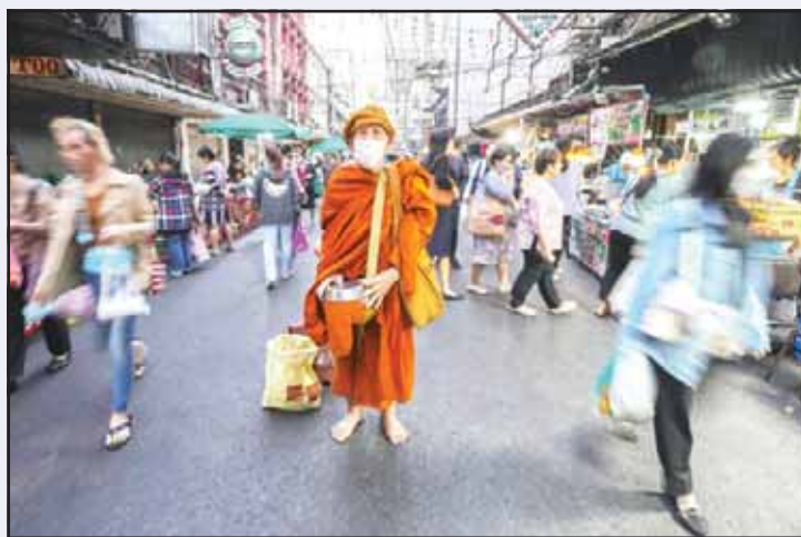
A Thai Buddhist monk wears winter hat as he waits for offerings in Bangkok, Thailand, Thursday, Jan. 16, 2025.

Tropical Thailand gets cool respite: Tropical Thailand is experiencing an