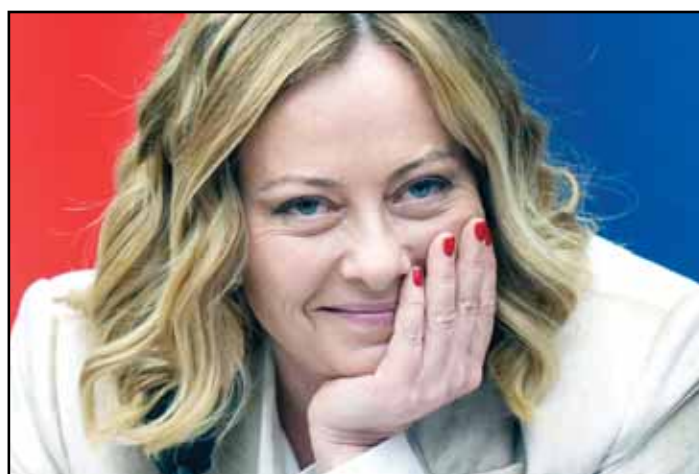
Italy's Premier Giorgia Meloni holds the year-end press conference in Rome, Jan. 9, 2025.

Meloni has led her once-fringe, post-fascist party from the extreme right to more mainstream positions, especially on foreign policy. She gained ground as a leading political figure in Europe after her far-right