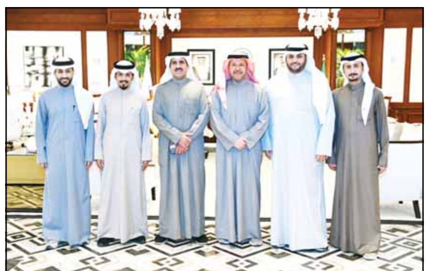
Farwaniya Governor with the leaders Union of Cooperative Societies.

Tel: +973 17701201 - Ext. 351 | Email: reservation@albander.com | www.albander.com | @albanderhotelandresort