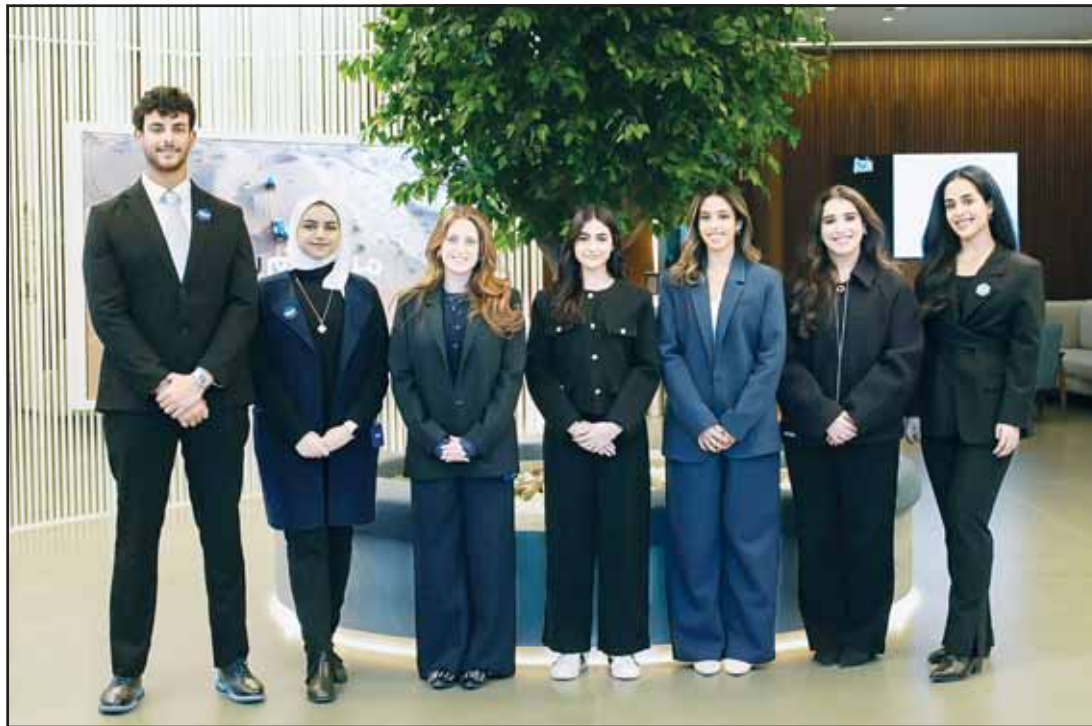
Group photo of the talented participants in the new GenZ cycle.

Furthermore, the graduates will be trained by and prepared to bolster