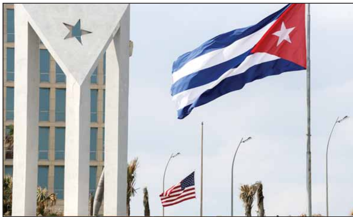
Cuban and American flags fly in the wind outside the American embassy in Havana, Cuba, Tuesday, Jan. 14, 2025.

The South African government has taken a hard-line approach to the miners — called "zama zamas" in the Zulu language, which roughly translates as "hustlers" or "chancers." They are often armed and part of criminal syndicates, the government says, and rob South Africa of more than $1 billion a year in gold.