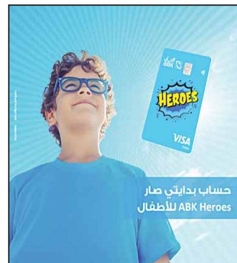
ABK Heroes flyer.