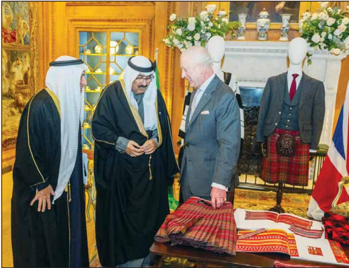
His Highness the Amir of Kuwait Sheikh Meshal Al-Ahmad Al-Jaber Al-Sabah and His Majesty King Charles III of the United Kingdom of Great Britain and Northern Ireland exchange the Scottish kilt and Kuwaiti bisht at Dumfries House in Ayrshire, Scotland, United Kingdom.

HH Sheikh Meshal Al-Ahmad wraps up historic visit, heads home