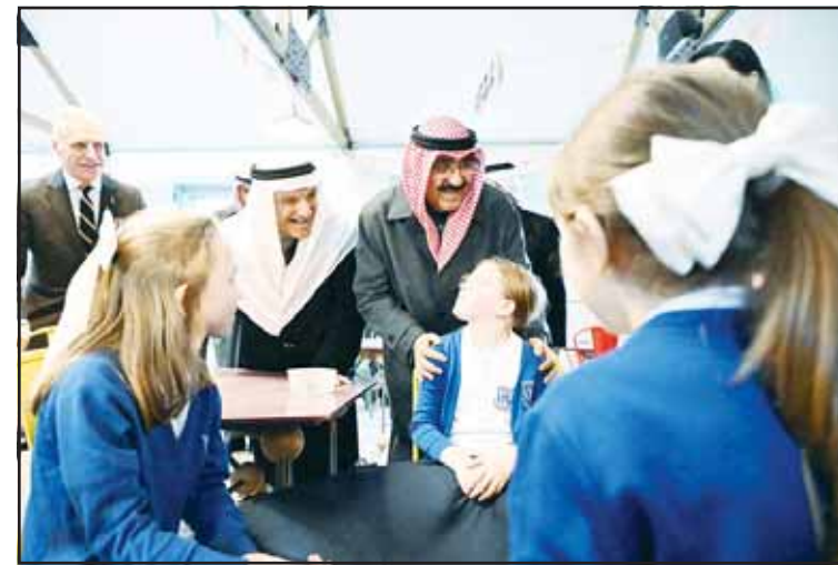
His Highness the Kuwaiti Amir visits students at the King's Foundation.