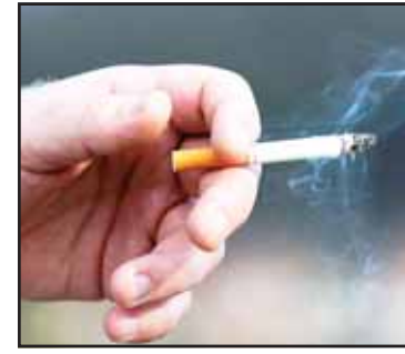
A man holds a lit cigarette while smoking in San Francisco, Dec. 2, 2020.

ingly back the idea and urged Kennedy to help implement it, if he is confirmed.