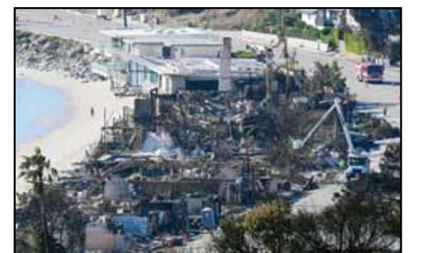
Homes along Pacific Coast Highway are seen burned and damaged while a few still stand after the Palisades Fire, Jan. 12, 2025, in Malibu, Calif.