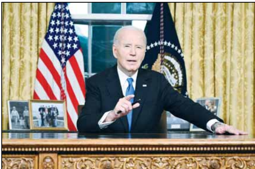
President Joe Biden speaks from the Oval Office of the White House as he gives his farewell address Wednesday, Jan. 15, 2025, in Washington.

President Biden used his farewell address to the nation Wednesday to deliver stark warnings about an "oligarchy" of the ultra-wealthy taking root in the country and