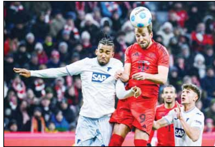
Hoffenheim's Kevin Akpoguma, left, and Munich's Harry Kane, right, go for a header during a German Bundesliga soccer match between FC Bayern Munich and TSG 1899 Hoffenheim in Munich, Germany.

Kane made it 3-0 with a penalty in the 26th. It was his 16th goal of