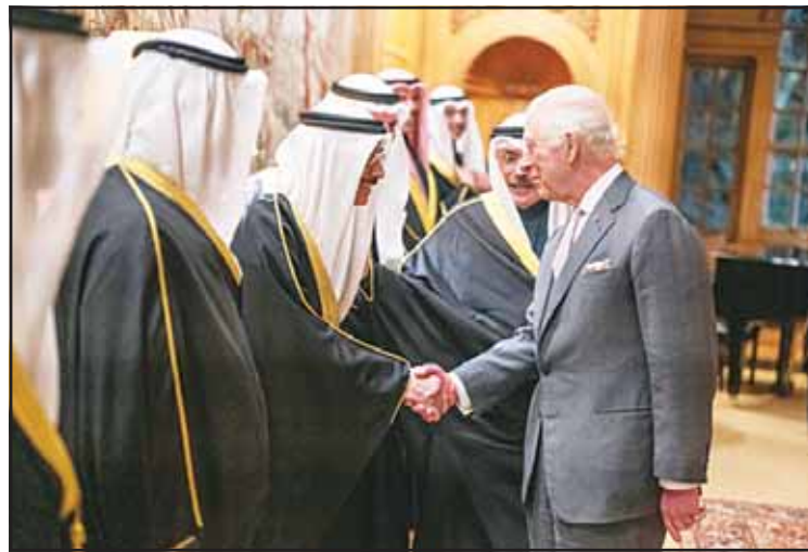
His Majesty King Charles shakes hands with members of the delegation accompanying HH the Amir.