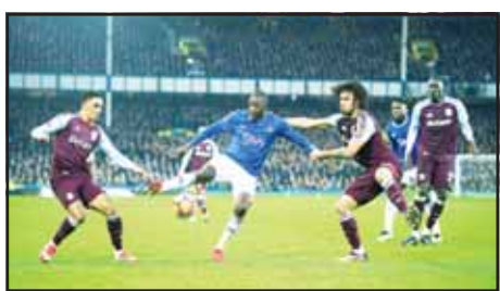
Everton's Abdoulaye Doucoure, centre, battles for the ball with Aston Villa's Boubacar Kamara, right, and Jacob Ramsey during the English Premier League soccer match between Everton and Aston Villa at Goodison Park, Liverpool, England. Villa won 1-0. — See Page 15