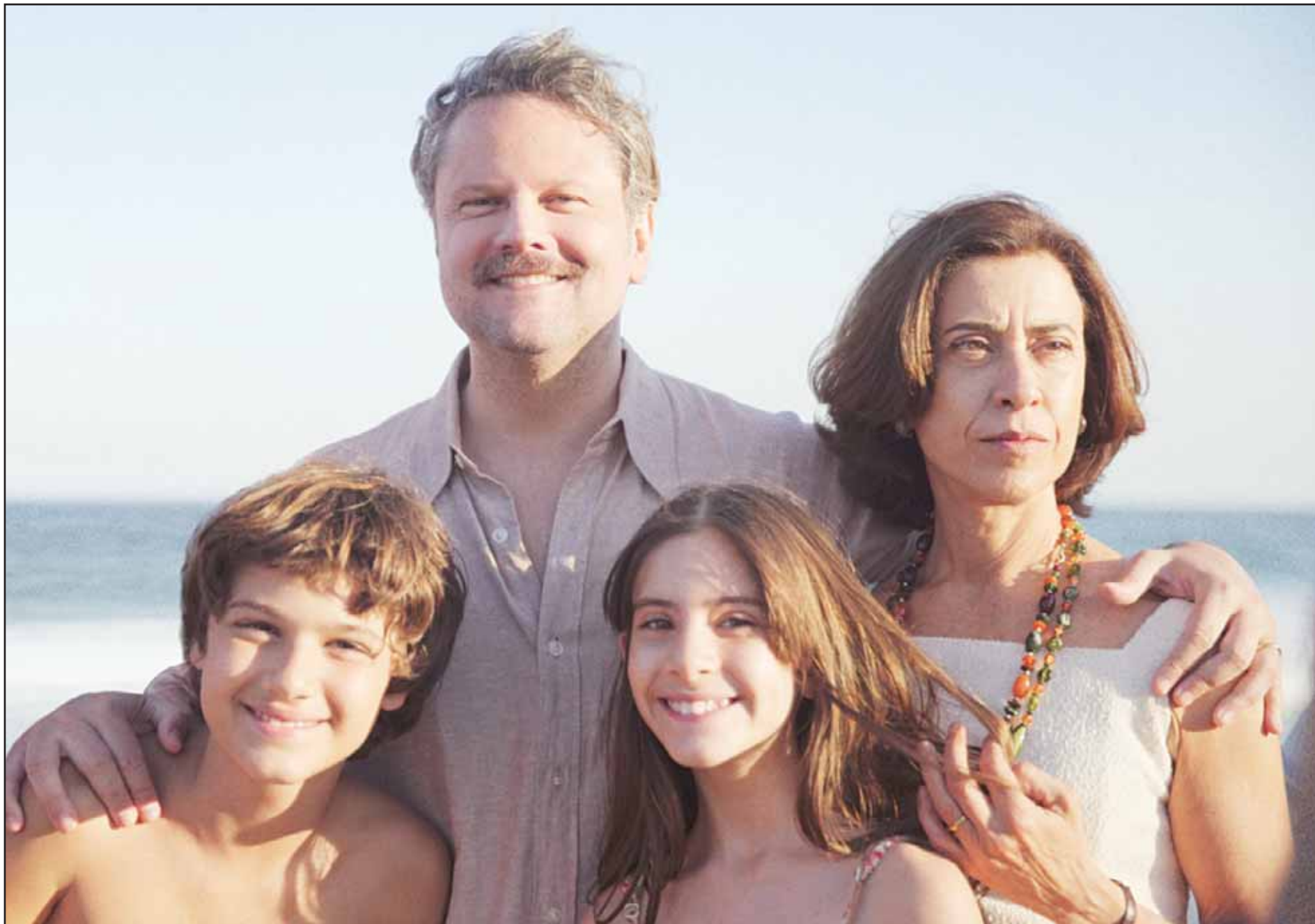
This image released by Sony Pictures Classics shows Selton Mello, (background left), and Fernanda Torres, (right), in a scene from 'I'm Still Here.'

Eunice's strength shines in Brazilian drama