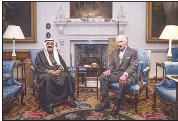
His Highness the Kuwaiti Amir and His Majesty King Charles.