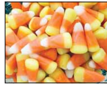
This image shows a pile of candy corn in Westchester County, N.Y., Oct. 23, 2023.

"The FDA is taking action that will remove the authorization for the use of FD&C Red No. 3 in food and ingested drugs," said Jim Jones, the FDA's deputy commissioner for human foods. "Evidence shows cancer in laboratory male rats exposed to high levels of FD&C Red No. 3. Importantly, the way that FD&C Red No. 3 causes cancer in male rats does not occur in humans."