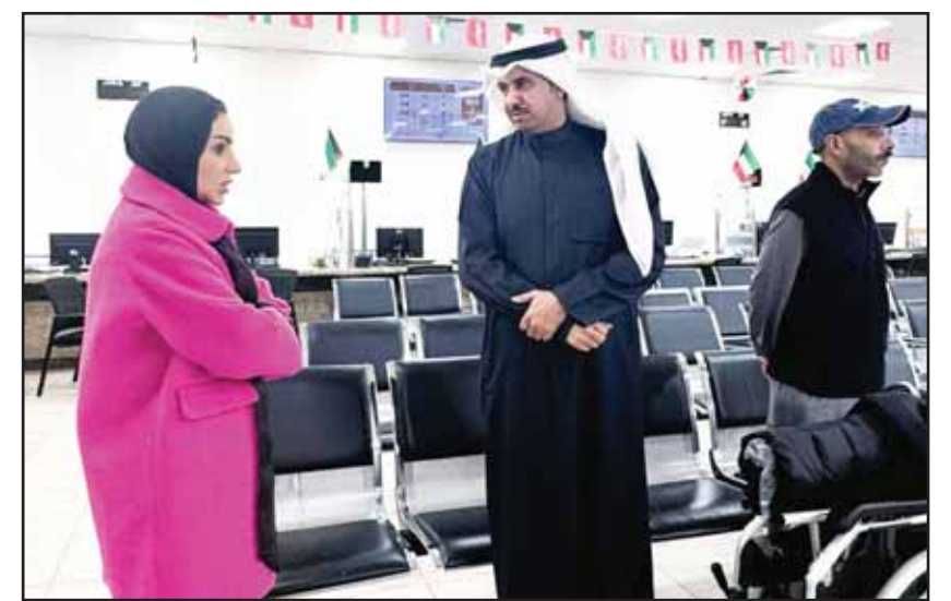
Minister of Social Affairs during the delivery of wheelchairs to people with disabilities.