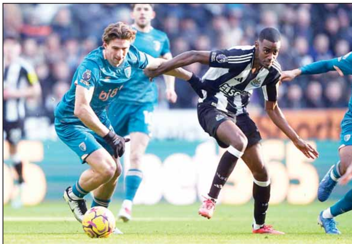
Bournemouth's Illya Zabarnyi, left, and Newcastle United's Alexander Isak, right, challenge for the ball during the English Premier League soccer match between Newcastle United and AFC Bournemouth in Newcastle upon Tyne, England.

formation and documents provided by the club in detail, the Premier League Board has concluded that it would not be appropriate or proportionate to continue to pursue the second part of their complaint," the joint statement said. "The club and the league agree that this brings to an end all proceedings between the league and the club in relation to the club's breaches of the PSR for the financial years ending 30 June 2022 and 30 June 2023."