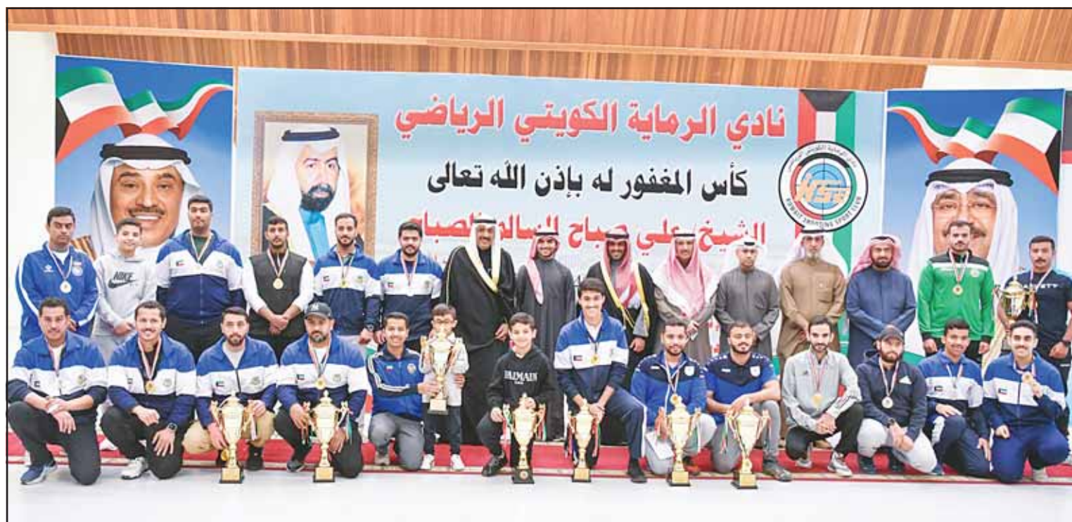
Winners of the Sheikh Ali Al-Sabah Shooting Championship with officials.

Beşiktaş, which was playing third-place Samsunspor later on Saturday, is sixth in the Turkish league standings and has been without a coach since Dutchman Giovanni van Bronckhorst was fired in late November. (AP)