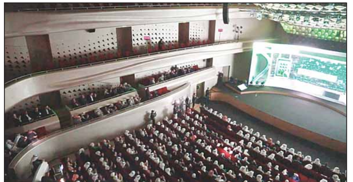
Unveiling the New Visual Identity