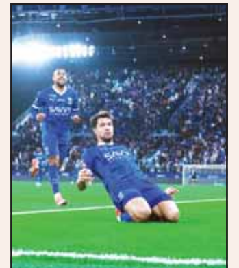
Al-Hilal player celebrates after scoring.

tory over Al-Fateh in Round 15 marked another milestone in the league's history. The match also recorded the highest number of yellow cards (6) and a single red card, emphasizing its intensity.