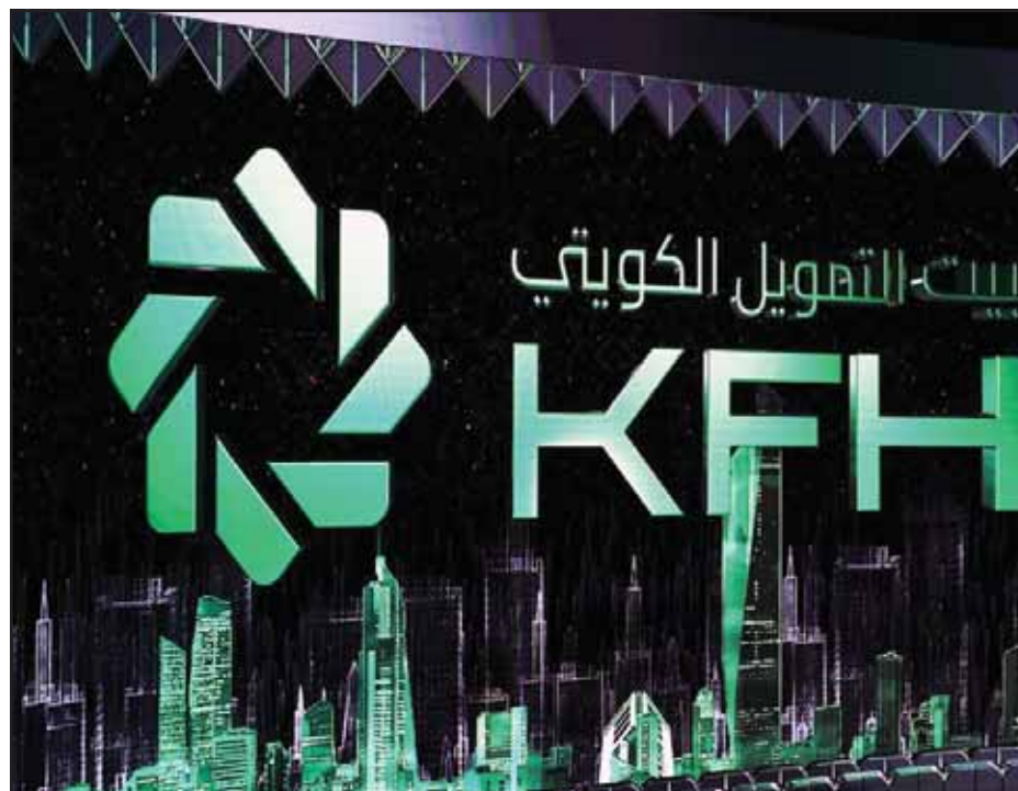
The New Visual Identity