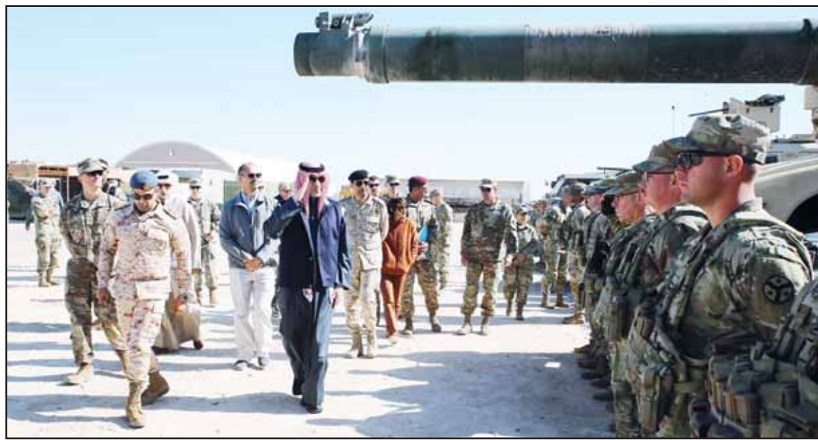
Kuwait's First Deputy Prime Minister, Minister of Defense and Minister of Interior visits Camp Buehring (formerly Camp Udaire'), northwest Kuwait on Saturday.

Collaboration bolsters regional security, stability