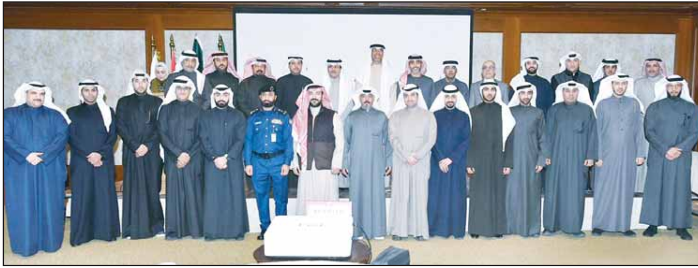
Kuwait Fire Force participates in the introductory seminar for the Sharjah Award in Public Finance.