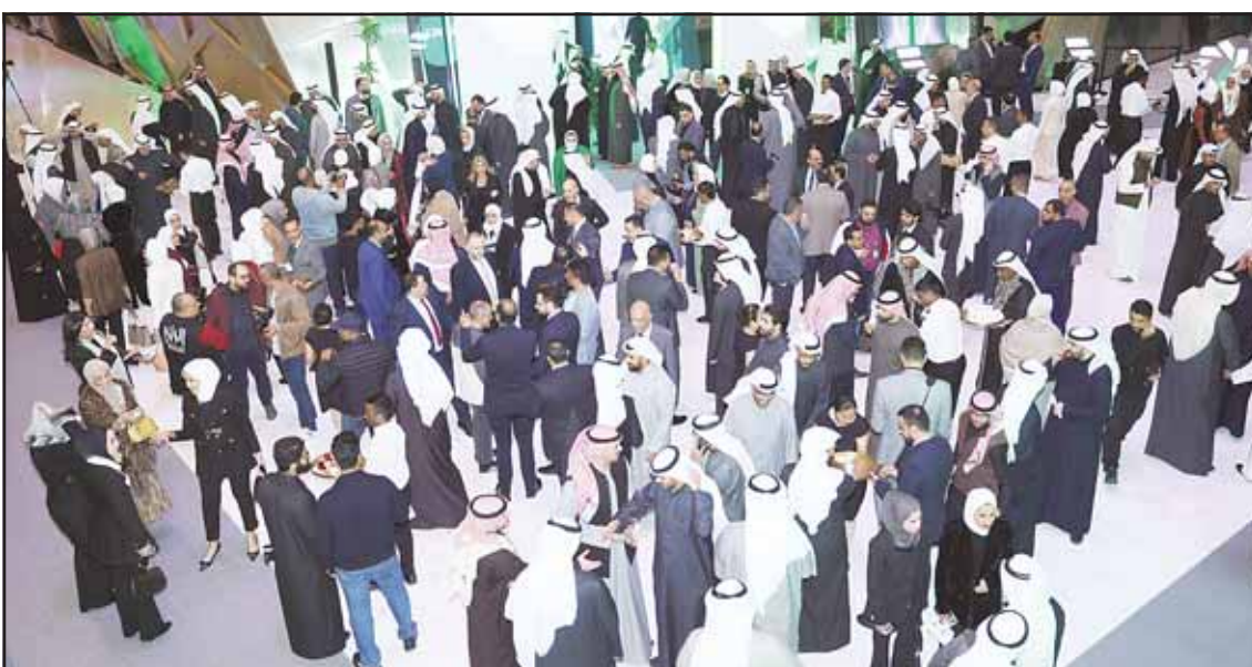
A crowd of employees.

Customers: The rebranding signifies KFH's continued commitment to providing modern, innovative, and accessible financial solutions, ensuring access to world-class services, enhanced digital tools, and a broader range of offerings and empowering customers to achieve their financial goals with a trusted, future-focused partner.