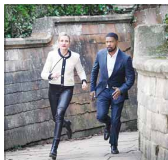
This image released by Netflix shows Cameron Diaz, (left), and Jamie Foxx in a scene from 'Back In Action.'