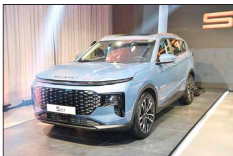
The sports car SOUEAST S07