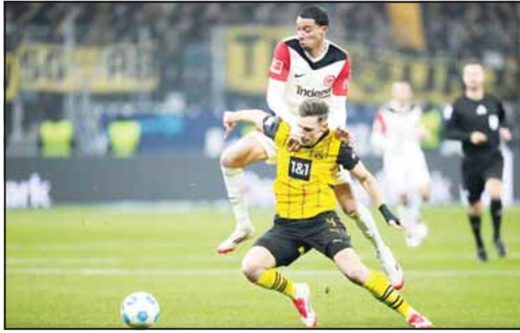
Frankfurt's Hugo Ekitike, back, challenges Dortmund's Nico Schlotterbeck during the German Bundesliga soccer match between Eintracht Frankfurt and Borussia Dortmund in Frankfurt, Germany.

Marmoush has played most of his breakout season in a two-striker formation with Hugo Ekitike, who scored the opening goal in the 18th minute with a low shot through defender Waldemar Anton's legs to finish off an incisive counterattack.