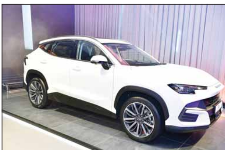
The car SOUEAST S06

With SOUEAST entering the Kuwaiti market, Al Mulla Auto is excited to offer a range of vehicles that emphasize quality, innovation, and easy lifestyle. Our partnership with SOUEAST represents a transformative moment in our commitment to the evolving needs of our customers, showcasing vehicles that not only meet but exceed expectations. We invite all automotive enthusiasts and prospective buyers to visit our new showroom in Al Rai and discover how SOUEAST vehicles embody the blend of style, performance, and cutting-edge technology all for the main purpose of making their lives easy.