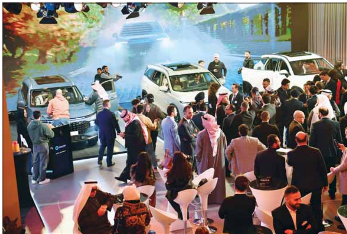
Part of the attendees at the event.

The celebration of launching the brand SOUEAST and the inauguration of the showroom follows the recently signed agreement between Al Mulla Group and Wuhu Jetour Automobile Sales Co. Ltd., which appointed Al Mulla International Auto Trading Company as the authorized distributor for SOUEAST vehicles in Kuwait. This partnership aims to deliver a range of dynamic vehicles by SOUEAST combining cutting-edge technology, comfort, and style to meet and exceed the growing diverse needs of Kuwaiti drivers. Furthermore, this collaboration reflects the commitment of Al Mulla Automotive to offering high-quality, innovative and seamless automotive solutions tailored to modern Kuwaiti consumers, whilst continuing to experience the Al Mulla Group's promise of unsurpassed commitment to offering the best products and services backed-up by our unparalleled dedication to excellence and professionalism in