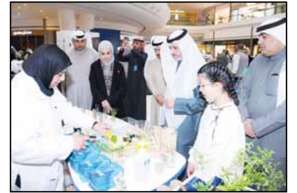
Part of the Seventh Children's Science Exhibition.