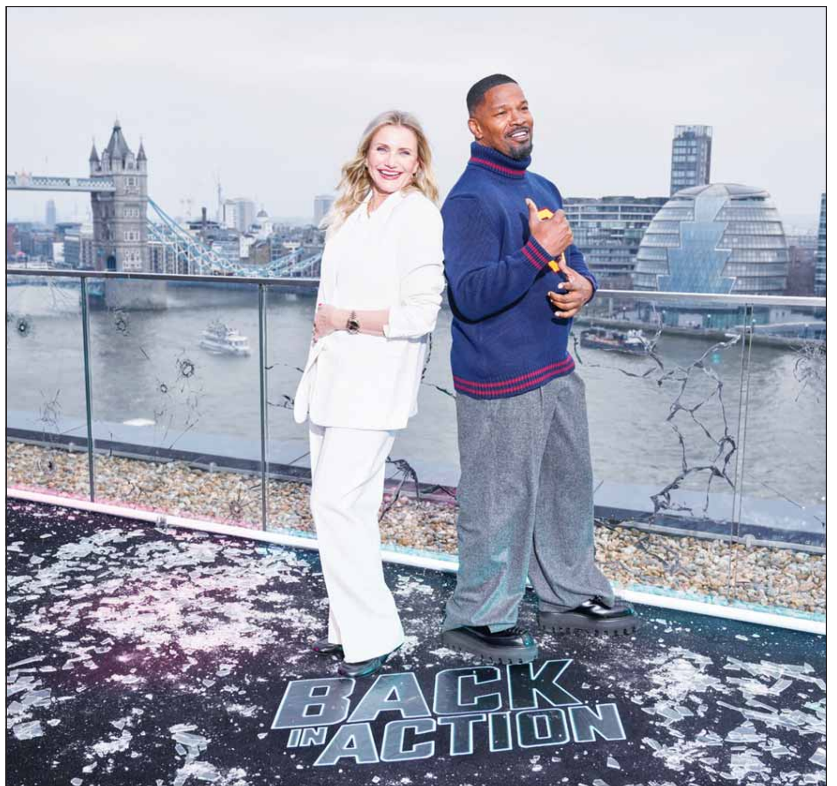
Cameron Diaz, (left), and Jamie Foxx pose for photographers at the photo call for the film 'Back In Action' on Friday, Jan. 17, in London.