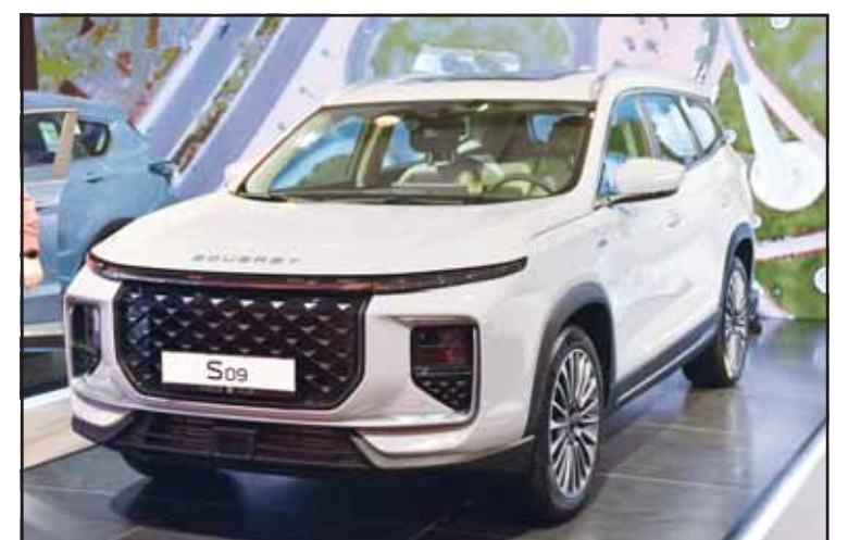
The car SOUEAST S09