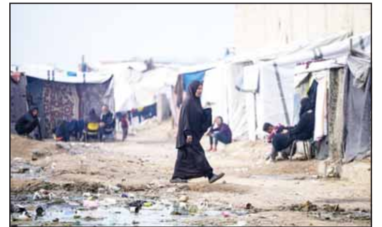
A woman walks at a tent camp for displaced Palestinians in Deir al-Balah, central Gaza Strip, Thursday Jan. 16, 2025. WHO aims to strengthen health services in Gaza, West Bank amid ceasefire. (AP)

Peepkorn stressed the necessity of removing the security and political barriers that hinder the delivery of aid