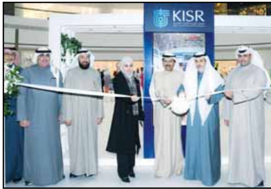
Opening of the Seventh Children's Science Exhibition.

Initiative to foster scientific creativity and research skills among Kuwait's youth