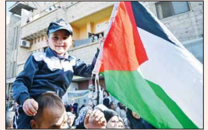
People gather to celebrate a newly reached ceasefire deal between Israel and Hamas, in Damascus, Syria, Jan. 17, 2025.

CAIRO, Jan 18, (AP): The ceasefire between Hamas and Israel will go into effect in less than 24 hours, said Qatar's foreign ministry on Saturday.