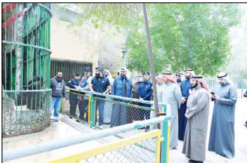
Farwaniya Governor Sheikh Athbi Naser Al-Athbi Al-Sabah visits the zoo in Omariya.