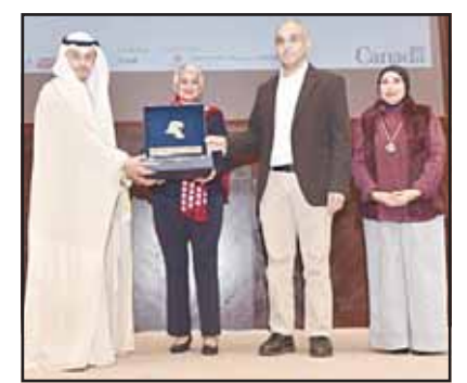
Token of appreciation being presented.

She said, "The 60th anniversary of relations between the two countries comes at a time of change and transformation for both