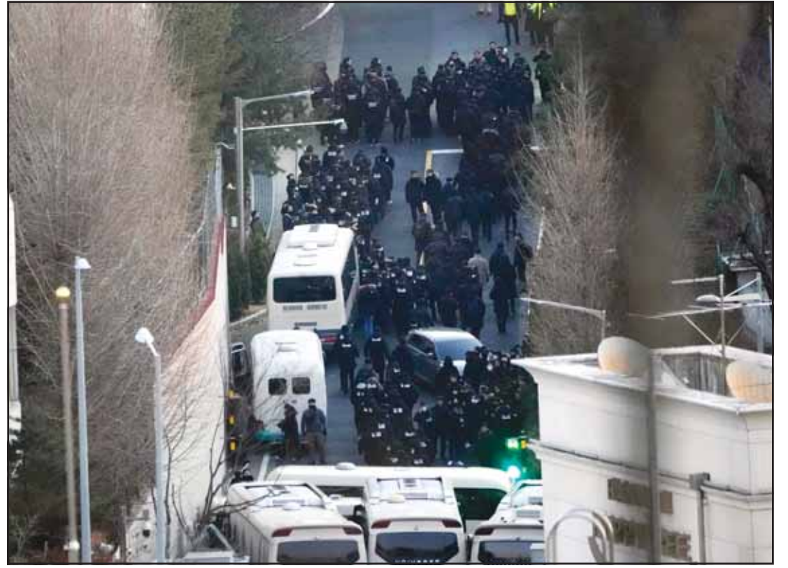
Investigators from the state anti-corruption agency and police officers make their way to the residence of impeached President Yoon Suk Yeol to execute a warrant to detain Yoon in Seoul, South Korea, on Jan 15.

Last year, the South Korean Army conducted its first overseas drills involving the K2 and K9 in Qatar, as part of efforts to bolster cooperation with counterparts in the Middle East, the report added.