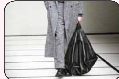
A model presents a creation part of the men's Giorgio Armani Fall-Winter 2025-2026 collection.

Most of that expansion - a full 80% - was due to price increases that outpaced innovation, the McKinsey-Business of Fashion report said.