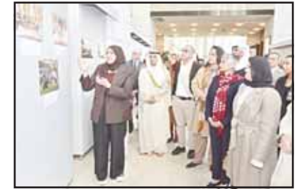
Photos during the celebration of the 60th anniversary of diplomatic relations between Canada and Kuwait at the Kuwait National Library.