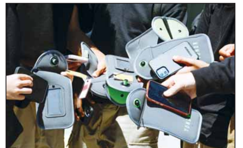
A student uses a cell phone after unlocking the pouch that secures it from use during the school day at Bayside Academy, Aug. 16, 2024, in San Mateo, Calif.