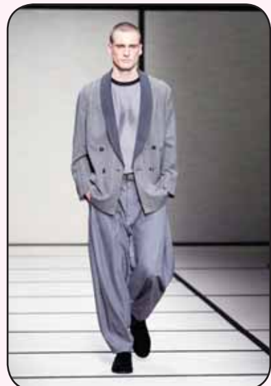
A model wears a creation from Giorgio Armani's collection.