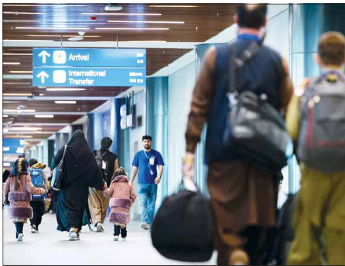
This photo provided by US Embassy, Philippines, shows the arrival of Afghan US Special Immigrant Visa Applicants in the Philippines on Jan 6.

China is believed to execute more prisoners each year than the rest of the world combined, though the precise total is classified a state secret. Executions are traditionally carried out by gunshot, though lethal injections have also been introduced in recent years.