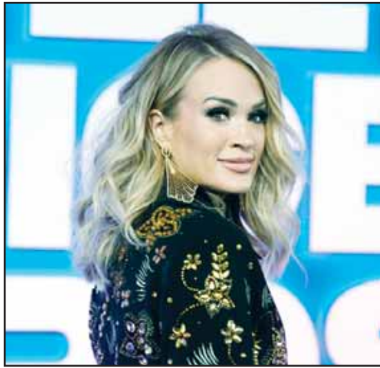
Carrie Underwood arrives at the People's Choice Awards, Dec. 6, 2022, in Santa Monica, Calif.