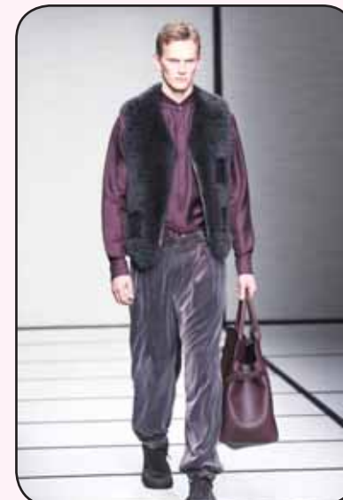
A model presents a creation from Giorgio Armani's collection.