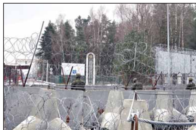
Polish border guards look east into Belarus at the crossing point Polowce-Pieszczatka in Polowce, Poland on Jan 16.

It's needed, the government in Warsaw says, because Russia and Belarus are waging a particular kind of hybrid warfare: helping groups of migrants - mostly from Africa or the Middle East - to break through the border to provoke and destabilize Poland and the