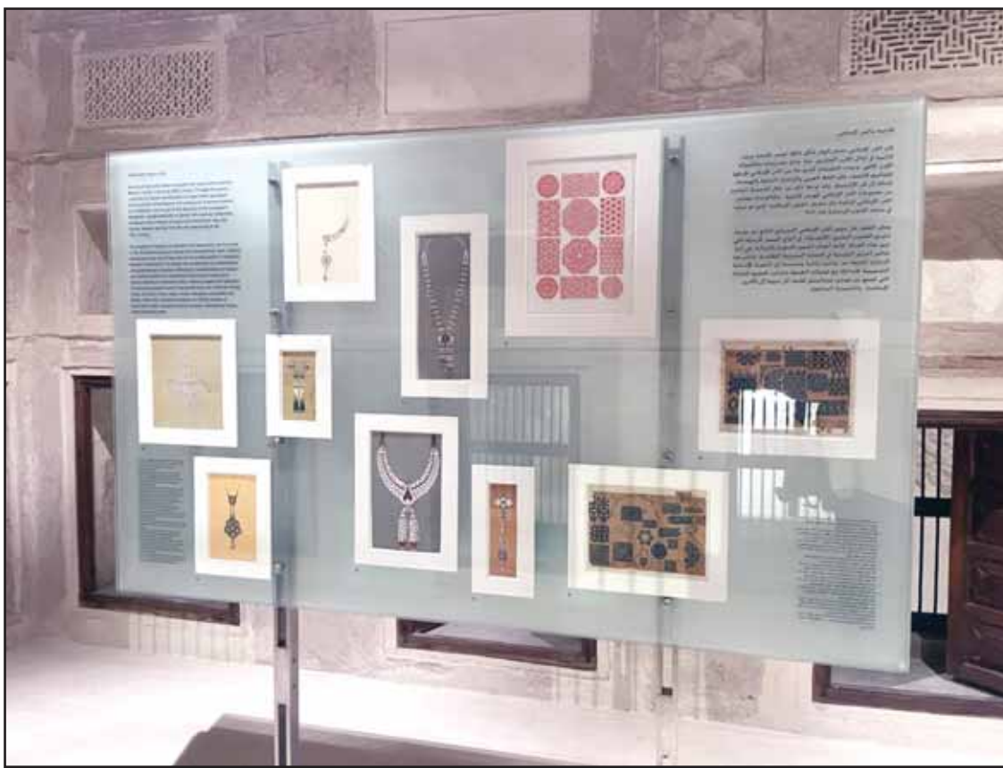
Unique decorations and precision in design.