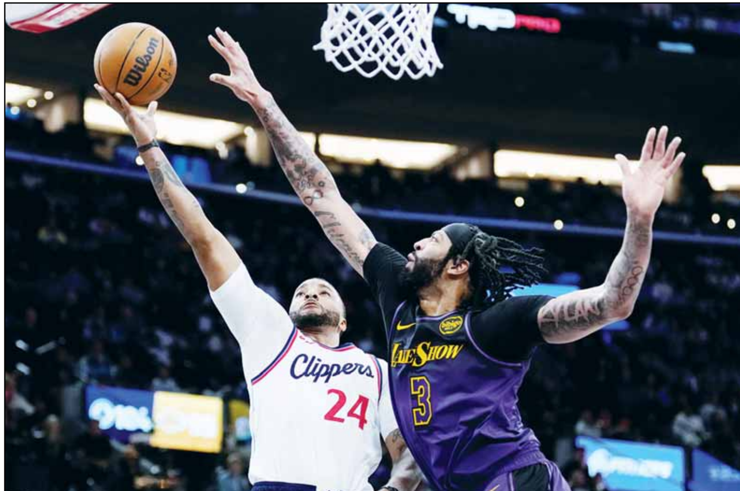
Los Angeles Clippers guard Norman Powell, left, shoots as Los Angeles Lakers forward Anthony Davis defends during the second half of an NBA basketball game in Inglewood, Calif.