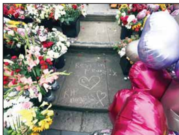
Tributes are seen outside the Town Hall in Southport, England, Aug. 5, 2024 after three young girls were killed in a knife attack at a Taylor Swift-themed holiday club the week before.

Violent groups made up mostly of men who were mobilized