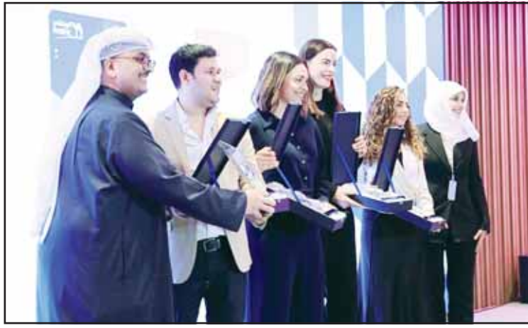
Alshaya Group team honored.