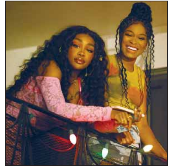
This image released by Sony Pictures shows Keke Palmer, right, and SZA in a scene from 'One of Them Days.'