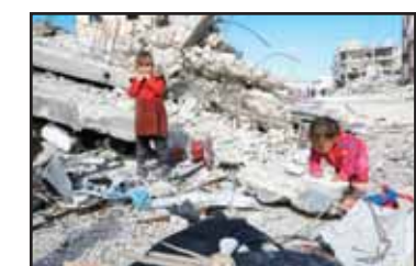
Children play in the rubble of a destroyed building in Rafah, southern Gaza Strip, Monday, Jan. 20, 2025.

Meanwhile, Egyptian President Abdel-fattah El-Sisi affirmed on Monday the need to begin reconstructing Gaza Strip and make it habitable again, ensuring the return of normal life for its