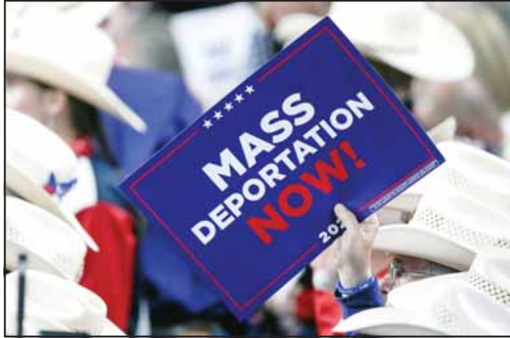
A member of the Texas delegation holds a sign during the Republican National Convention, July 17, 2024, in Milwaukee.