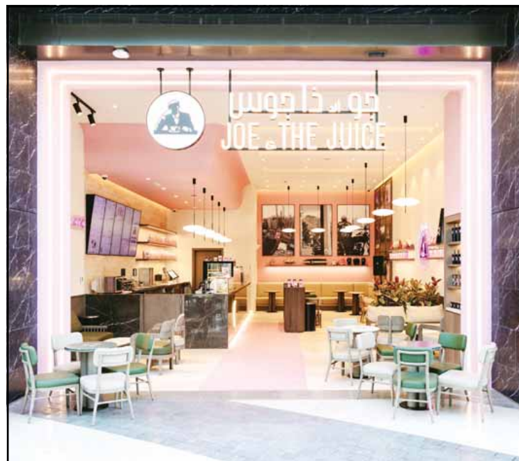
New Joe &amp; The Juice store in 360 Mall.

Active since 2004, she has become a key figure in preserving and evolving the New Orleans jazz tradition, drawing inspiration from her experiences performing in streets, clubs and parades while learning from local elders.