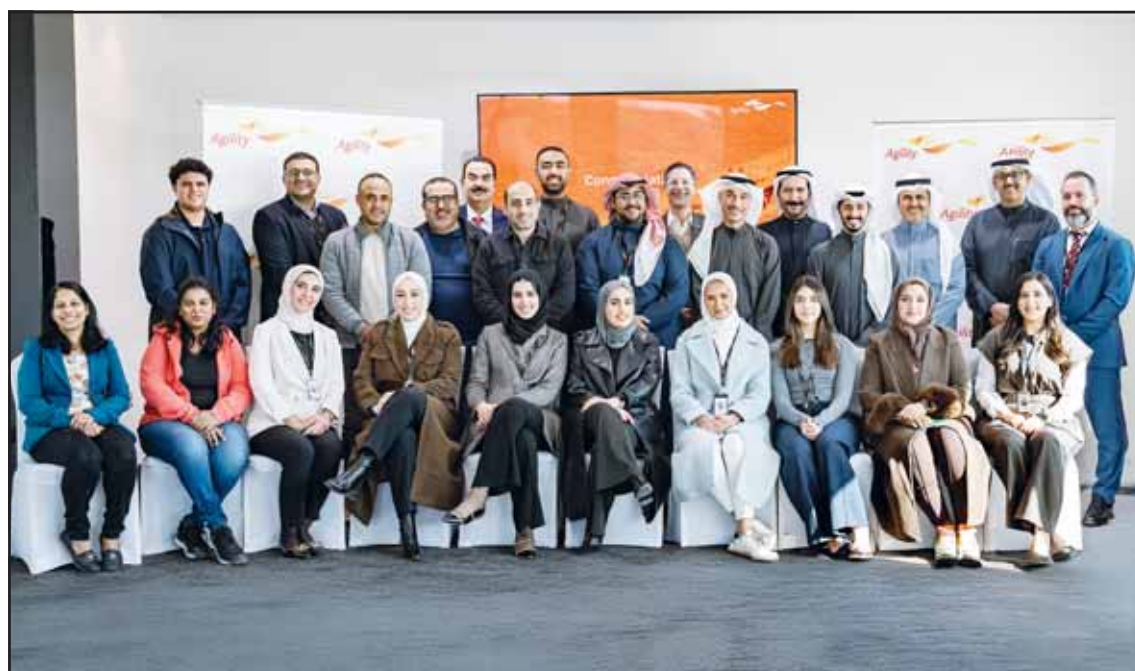
Agility LOYAC Internship Program.

Agility's focus on education and skill development extends beyond this training program. Since 2006, Agility has been a strategic partner