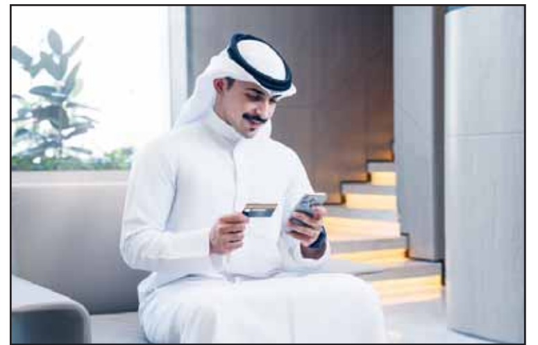
Gulf Bank enhances private banking experience with revamped identity.

Recently, Gulf Bank received the Best Next-Generation Offering award at the 2024 Private Banker International Global Wealth Awards in Singapore. This recognition highlights the bank's success in expanding its offerings and effectively