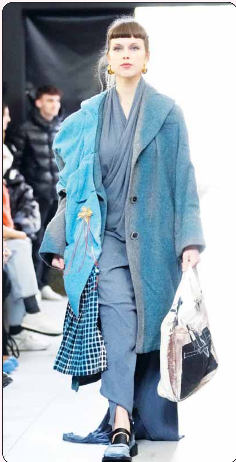
A model wears a creation part of the men's and Women's Simon Cracker Fall-Winter 2025-2026 collection, that was presented in Milan, Italy, Jan. 19, 2025.

The coed looks created from recovered and deadstock garments, materials and accessories included a tongue-in-cheek