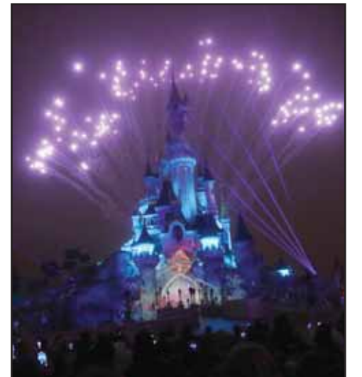
A light show is projected on the castle of Sleeping Beauty as fireworks explode in Disneyland, in Marne-la-Vallée, east of Paris, Friday Jan. 17, 2025.