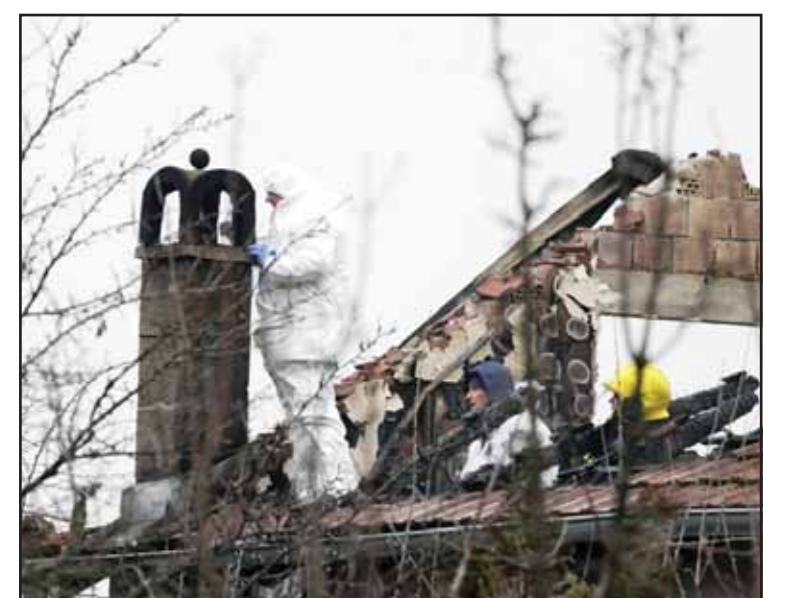
Police officers inspect a home for the elderly where eight people died in a fire, in Barajevo, a municipality of Belgrade, Serbia on Jan 20.

As far as the Polish authorities are concerned, their methods are working. The number of people arriving in Polowce has dropped significantly. Around 670 people applied for asylum there last year, and none to mid-January. The Office for Foreigners was empty when reporters visited.