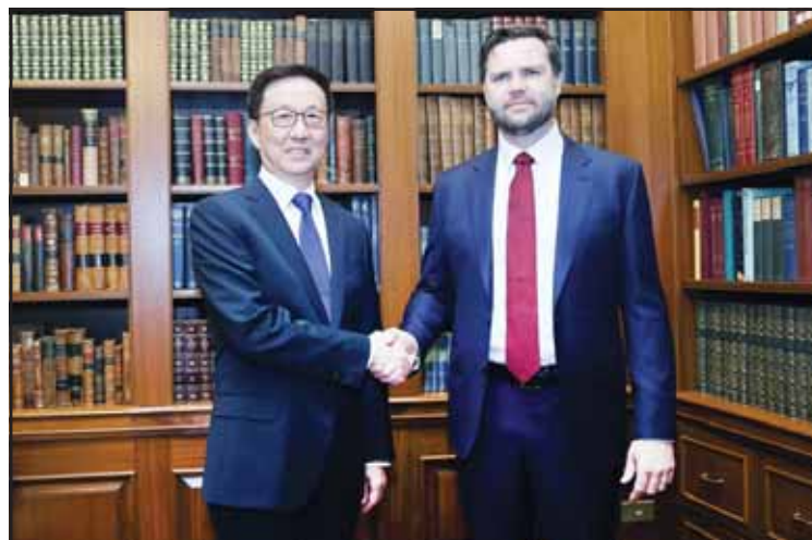
Chinese Vice President Han Zheng, as Chinese President Xi Jinping's special representative, meets with U.S. Vice President-elect J.D. Vance in Washington, D.C., Jan 19.

Han also met with Musk and other top US business executives, including representatives of the U.S.-China Business Council and the US Chamber of Commerce in Washington, DC, according to the Chinese Foreign Ministry.