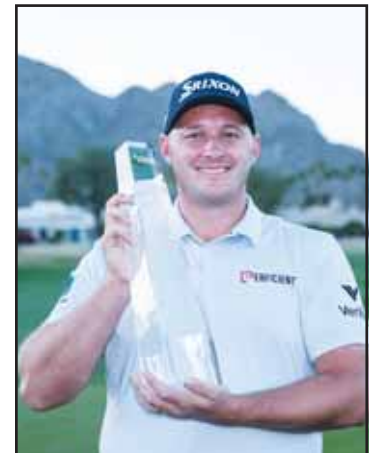
Sepp Straka holds the trophy after winning the American Express golf tournament in La Quinta, Calif.

Thomas, who finished in a third-place tie at The American Express last year, made six birdies on his first 11 holes in the final round to briefly trim Straka's lead to three shots. The two-time PGA Championship winner ran out of steam on the back nine in