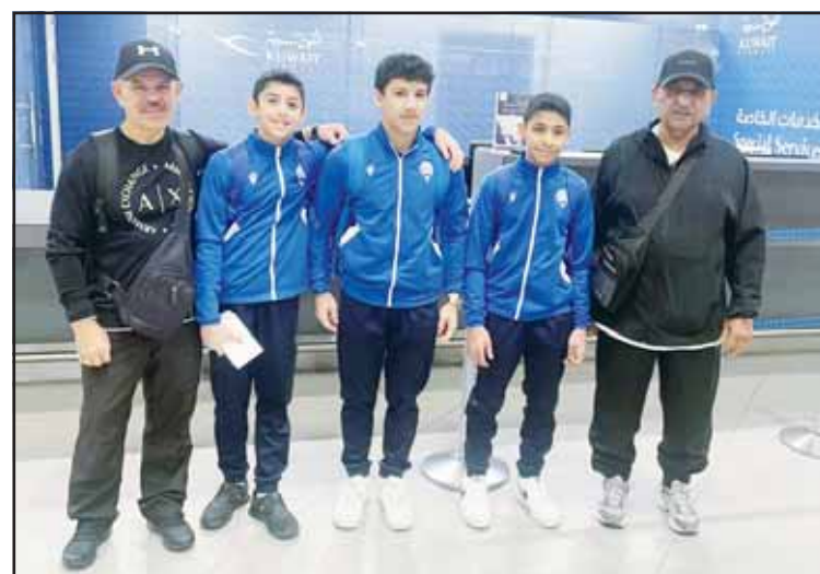
The Kuwaiti gymnastics delegation.