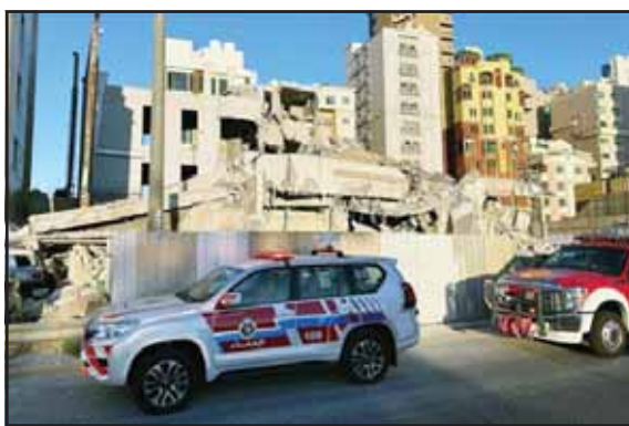
KFF vehicles at the site of incident.

Regarding specific issues such as gunfire at weddings, Brigadier Al-Rabbah emphasized that these cases are dealt with promptly, with patrols being dispatched immediately to apprehend the offenders.