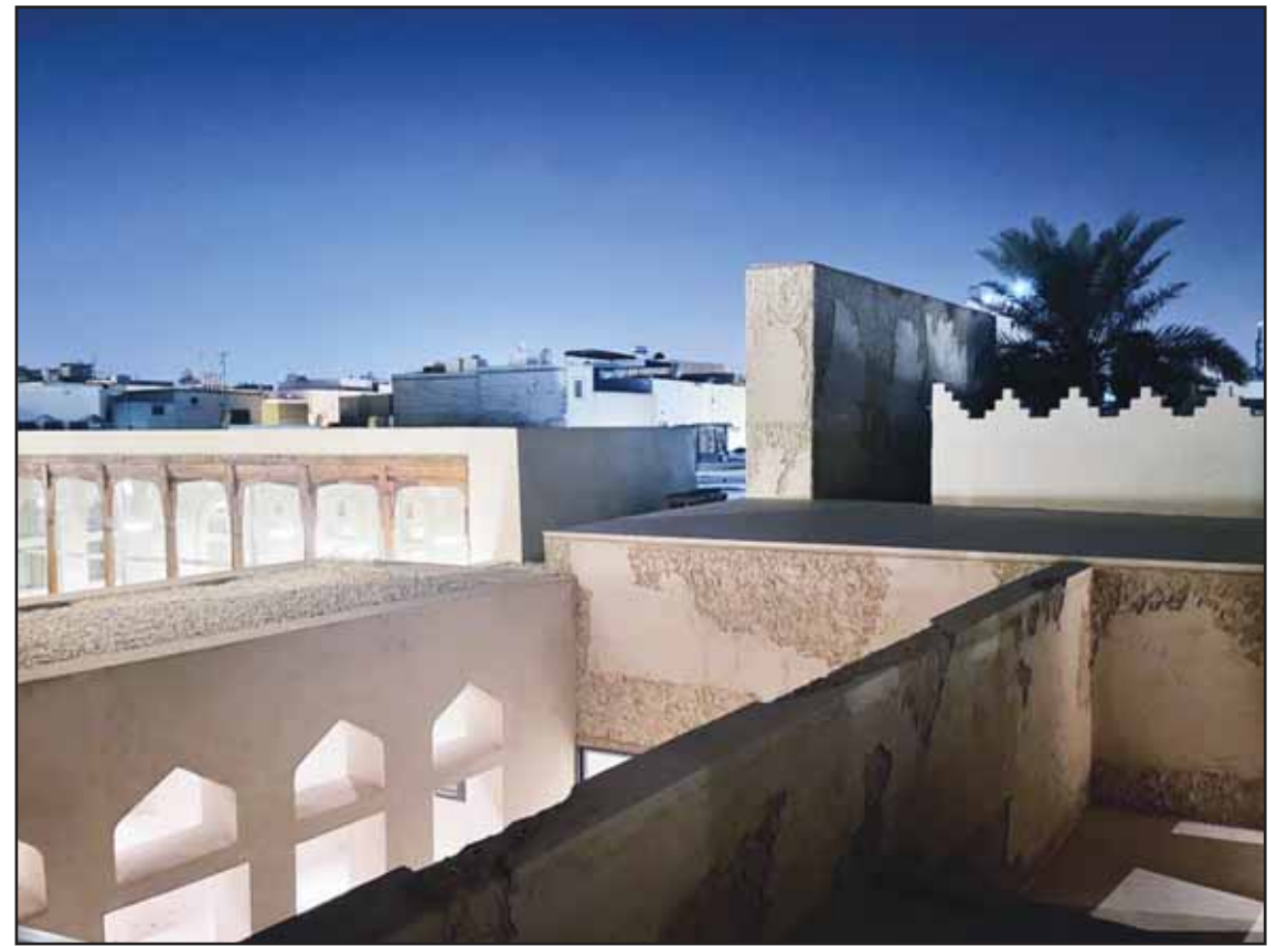
Sovereign Council, the oldest stone structures in Muharraq.