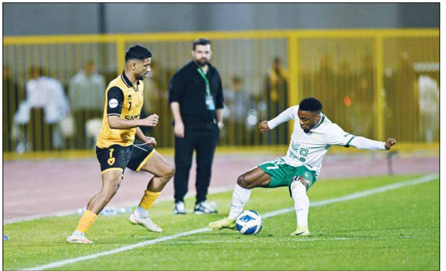
Al Arabi and Al Qadsiya players challenging for the ball.