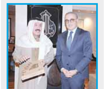
2 Editor-in-Chief of Arab Times, Al-Jarallah, hosts Tunisian ambassador