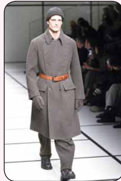
A model wears a creation part of the men's Giorgio Armani Fall-Winter 2025-2026 collection.

A new study by McKinsey consultancy and The Business of Fashion said that top brands are facing a significant slowdown this year, after a four-year period of exceptional growth from 2019-2023 that allowed the sector to grow by a compounded 5% a year despite the pandemic.