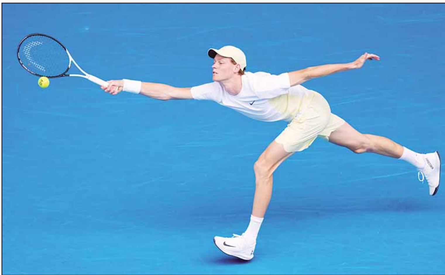
Jannik Sinner of Italy plays a forehand return to Holger Rune of Denmark during their fourth round match at the Australian Open tennis championship in Melbourne, Australia.

Sonego will next play 21st seed Ben Shelton, who progressed after 38-year-old Gael Monfils pulled the