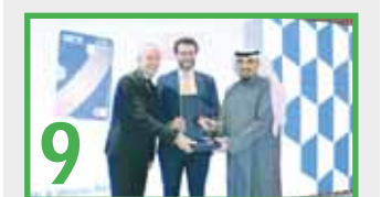
9 NBK and Alshaya Group launch exclusive collaboration with Mastercard