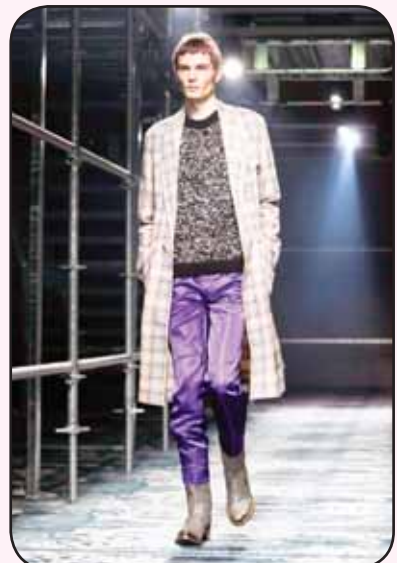
A model presents Prada's creation.

"I feel like I am part of a community," she said after the show. "I think this is something that is important, and a lot of fun."