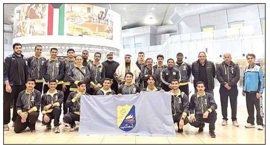
Kuwait University delegation participating in the 10th Sports Tournament for Students of Universities and Higher Education Institutions in the Gulf Cooperation Council Countries.

Kuwait's participation in this sports gathering reflects the extent of its keenness to build bridges of communication and cooperation between the people of the GCC and strive towards building and preparing a promising sports generation capable of representing its country in regional and international forums, he added.