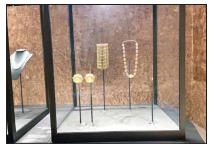
Some of the archival pieces crafted by the hands of the world's most skilled jewelry designers.