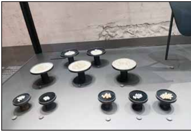
A rich cultural, civilizational, and economic heritage dating back to the pearl diving era.