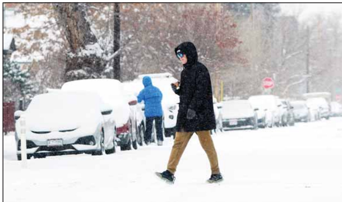
A pedestrian crosses First Avenue as a winter storm sweeps over the intermountain West, plunging temperatures into the single digits and bringing along a light snow in its wake on Jan 18, in Denver. (AP)

Francis, who grew up in Argentina in a family of Italian immigrants, has long prioritized the plight of migrants and called for governments to welcome, protect and integrate them, within their means. He has said the dignity and rights of migrants trump any national security concerns.