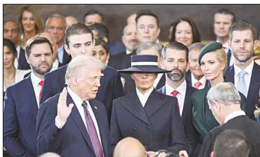
President-elect Donald Trump takes the oath of office during the 60th Presidential Inauguration in the Rotunda of the U.S. Capitol in Washington, Monday, Jan. 20, 2025. (AP)

WASHINGTON, Jan 20, (AP): Donald Trump, who overcame impeachments, criminal indictments and a pair of assassination attempts to win another term in the White House, was sworn in as the 47th president Monday, taking charge as Republicans assume unified control of Washington and set out to reshape the country's institutions.