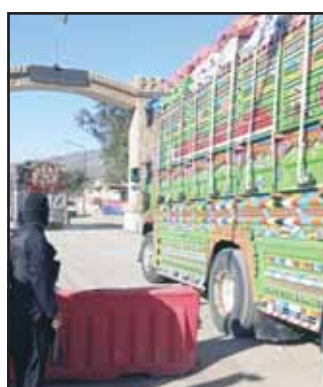
A police officer stands guard at a post while a convoy of aid trucks carrying medicines, food and other relief supplies for besieged residents, enter in Kurram, a restive northwestern Pakistani district in Pakistan's Khyber Pakhtunkhwa province on Jan 8.