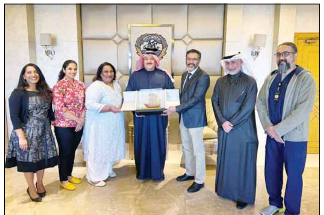
Kuwait Health Minister lauds IDAK's community and scientific initiatives.

The Minister has graciously accepted IDAK's invitation to attend the Felicitation Ceremony of the 5th IDAK International Scientific Symposium. Scheduled for April 25, 2025, this prestigious event will be held at the Al Hashemi Ballroom, Hotel Radisson Blu and is open to all dentists in Kuwait. The symposium will feature esteemed speakers from India and Kuwait, making it a significant platform for professional pursuits.