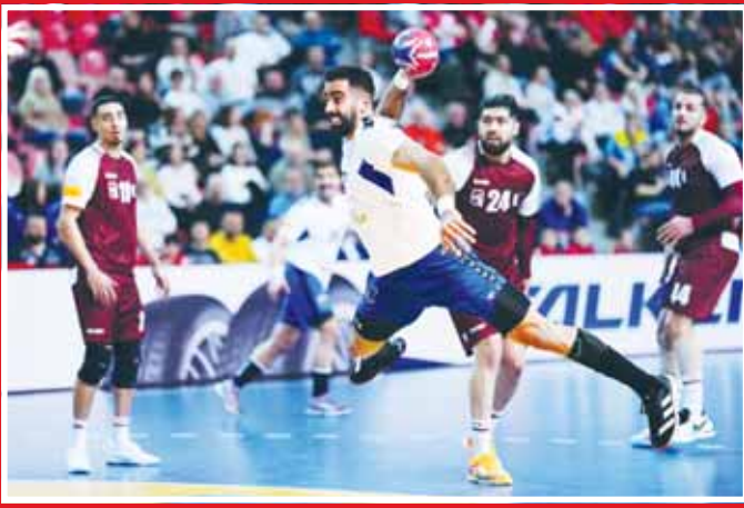
Strong performance from Kuwait against Qatar.

The lack of suitable replacements for injured players further exposed Al Qadsiya's vulnerabilities. In contrast, Al Arabi's reliance on their strong bench, coach's tactical approach, and the team's fighting spirit proved decisive. Al Qadsiya's struggles were compounded by absences and a lack of depth in its squad.