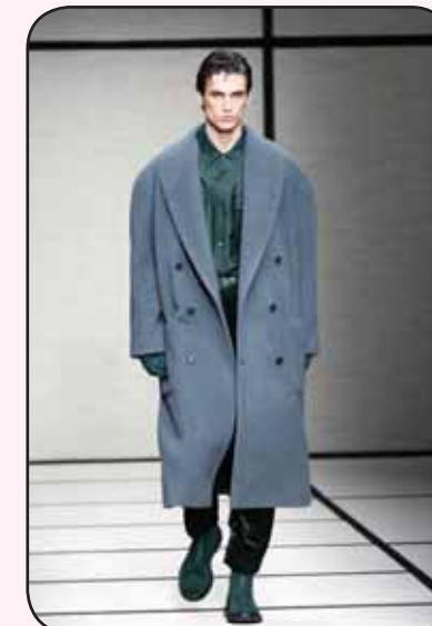
A model wears a creation from the Giorgio Armani collection.