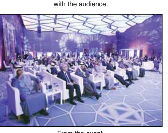
From the event.

ners, including Rasameel Investment, Architech, current and past members of judgespanels, mentors, experts, and speakers from Kuwait and around the world, the Zain team, and all the talented entrepreneurs and idea owners who have been a part of the program for 15 years.