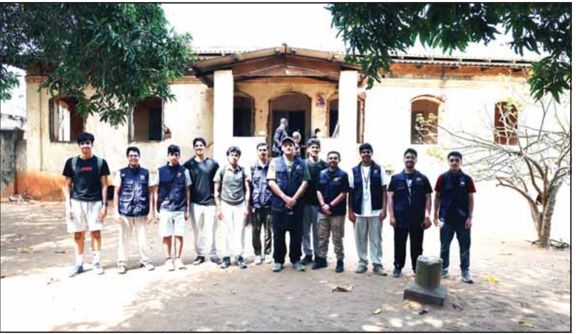
Photos from the Togo and Bosnia trip by the 'Be Among High-Achievers' students.

of culinary arts, in which they participated in a cooking workshop that included preparing some of the most traditional dishes in Bosnia.