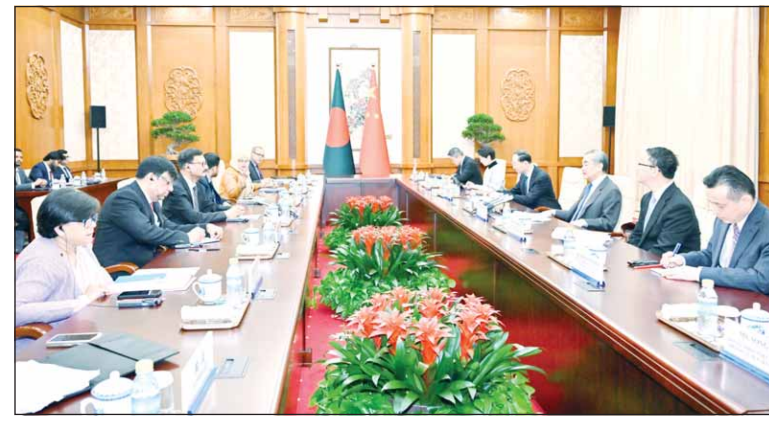
Chinese Foreign Minister Wang Yi, also a member of the Political Bureau of the Communist Party of China Central Committee, holds talks with Adviser for Foreign Affairs of the Interim Government of Bangladesh Touhid Hossain in Beijing, capital of China on Jan 21.