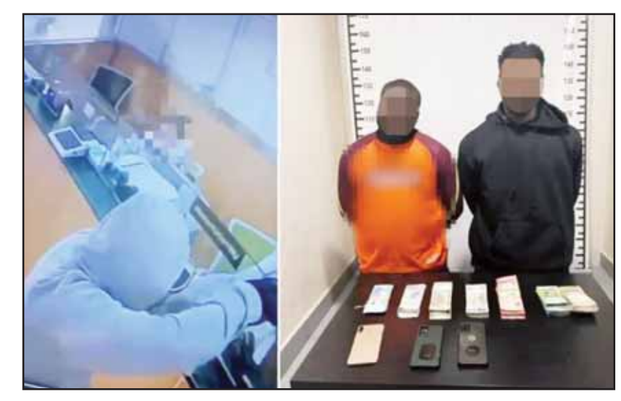
Video and photo from the Ministry of Interior show the daring armed robbery at a currency exchange office in Al-Mahboula and the swift capture of the gang behind it.

African gang was apprehended by the Criminal Security Sector's the General Department of Criminal Investigations within 24 hours of their armed robbery of a foreign exchange office in Mahboula. The gang stole approximately KD 4,600 in foreign currencies, reports Al-Seyassah