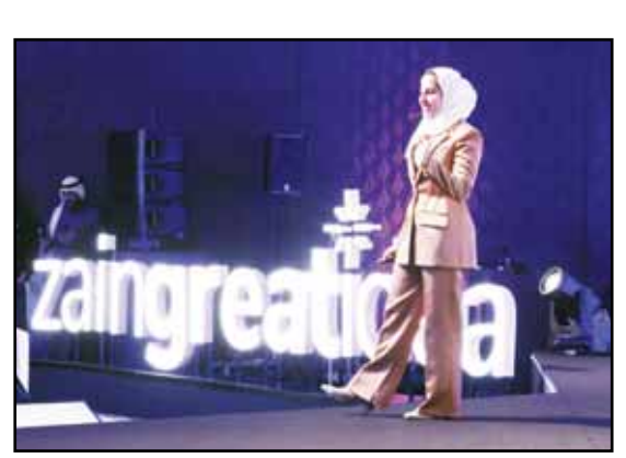
An entrepreneur presents her pitch during the event.