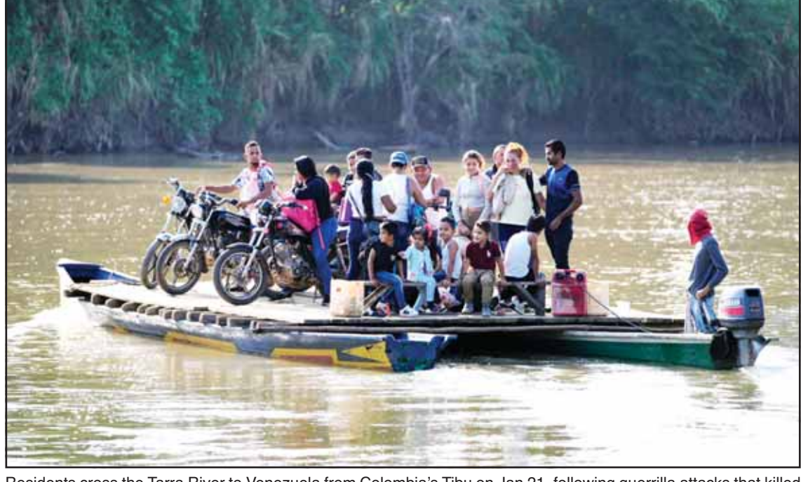
Residents cross the Tarra River to Venezuela from Colombia's Tibu on Jan 21, following guerrilla attacks that killed dozens and forced thousands to flee their homes in the Catatumbo region.

The Luohe's armaments include a variety of machine guns for close combat and anti-air and anti-ship missiles, according to defense publications, some of which say the ship could become the backbone of the Chinese navy.