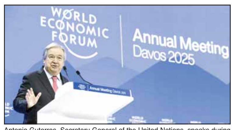
Antonio Guterres, Secretary-General of the United Nations, speaks during a plenary session in the Congress Hall during the 55th annual meeting of the World Economic Forum (WEF), in Davos, Switzerland, Wednesday, Jan. 22, 2025.

António Guterres, the United Nations secretary-general, has been one of the highest-profile advocates for the fight against climate change. That effort has been rattled by promises by U.S. President Donald Trump to" drill, baby, drill " and expand fossil-fuel production in the world's largest economy.