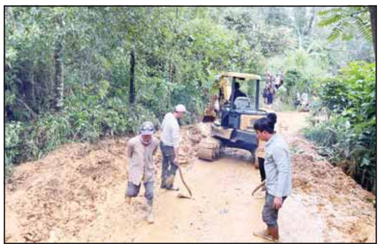
Workers clear a road cut off by a landslide following a flash flood in Pekalongan, Central Java, Indonesia on Jan 22.

Scores of rescue personnel recovered two mud-caked bodies as they searched a Petungkriyono area where tons of mud and rocks buried two houses and a café. Rescuers are still searching for seven people reported missing.