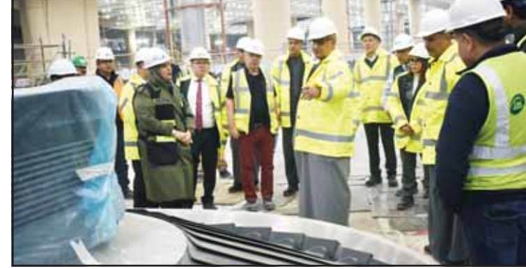
Executive Management on a project tour.