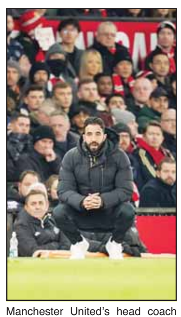
Ruben Amorim looks on during the English Premier League soccer match between Manchester United and Southampton at the Old Trafford stadium in Manchester, England.

"I am a young guy and sometimes I make a mistake. This time I needed to talk. Maybe it was a mistake and I get more nervous and go to the (media) conference really nervous, and then you say things you shouldn't