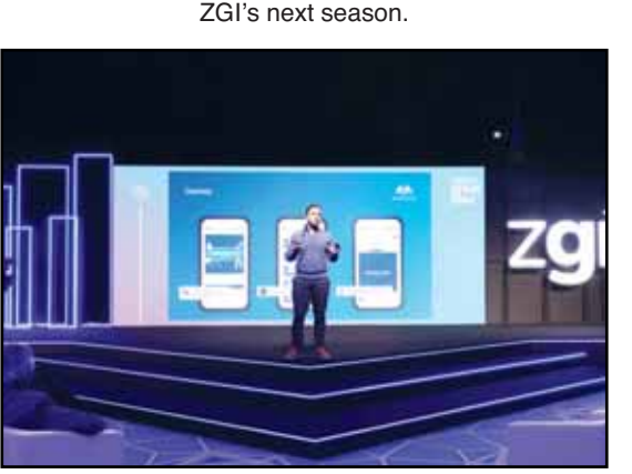
A participant shares the strategic vision of his company