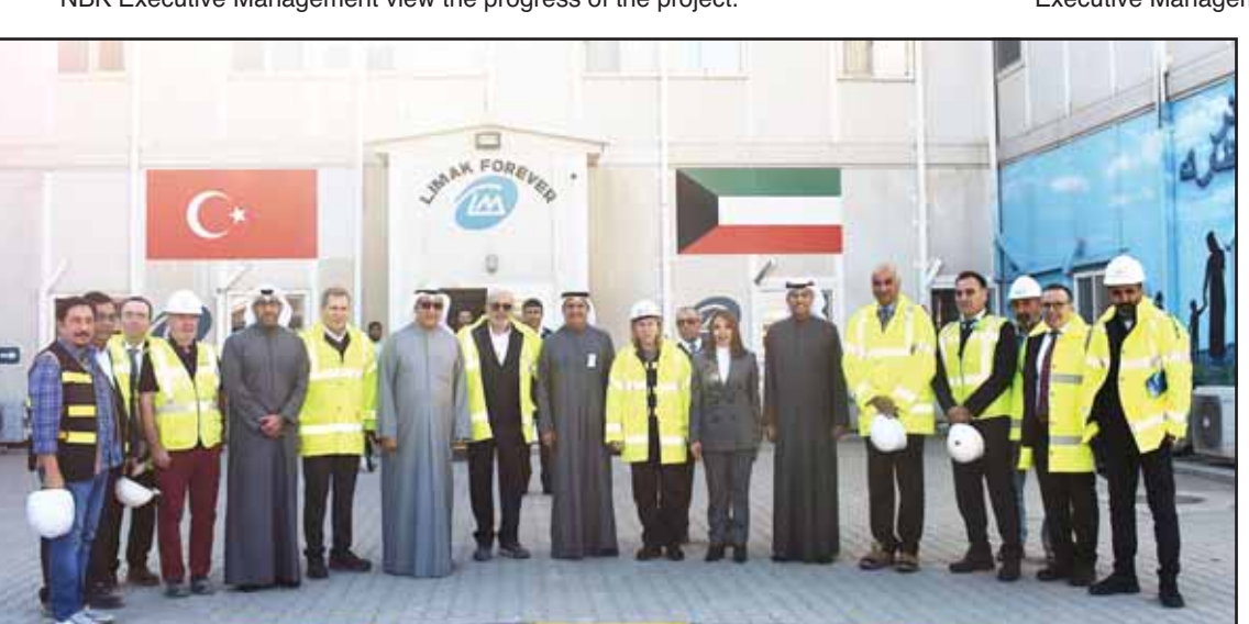
Executive Management in a group photo with Limak officials.

infrastructure projects, including the new Kuwait Airport project, which will form the new transit gatewaywith a capacity of 25 million passengers annually and an area of 708,000 square