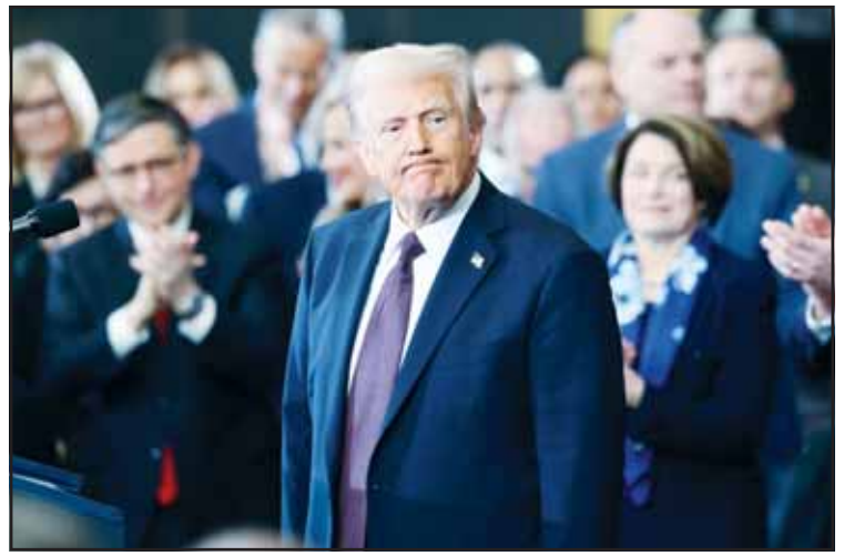
US President Donald Trump stands after taking the oath of office at the 60th Presidential Inauguration in the Rotunda of the US Capitol in Washington on Jan 20.

Sitting in the Oval Office just hours after being inaugurated on Monday, Trump rejected the characterization.