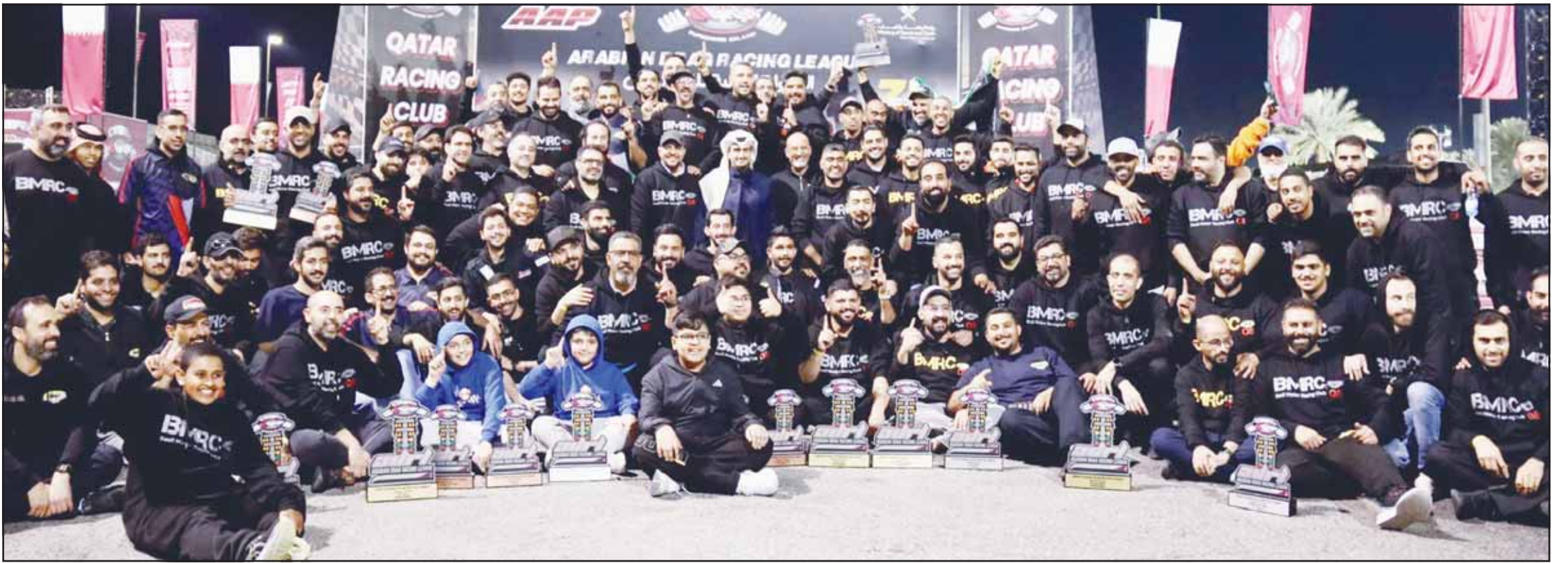
Basel Al-Sabah Club racing team.