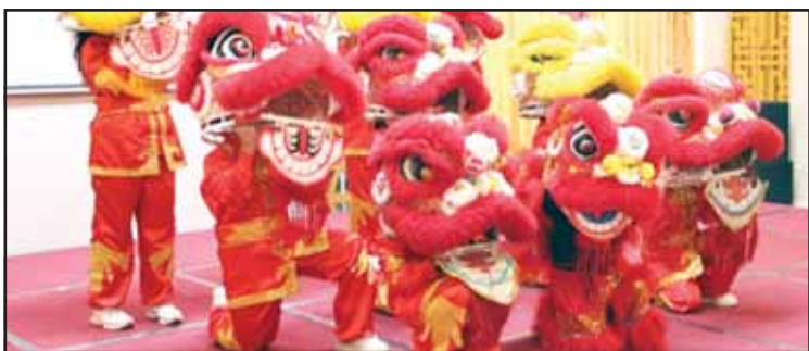
People perform lion dance during the Chinese Lunar New Year celebration.