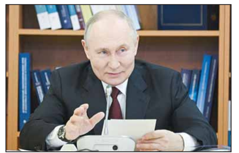
Russian President Vladimir Putin speaks during a meeting of the Board of Trustees of the Lomonosov Moscow State University in Moscow, Russia on Jan 24.

On Thursday, Trump told Fox News that Ukrainian President Volodymyr Zelenskyy should have made a deal with Putin to avoid the conflict.