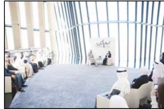
Part of the discussion panel.

trusted to them are completed on time. She emphasized the importance of initiating innovative ideas and demonstrating loyalty to their workplace, as this would enhance managers' trust in the employee. Such dedication, she explained, paves the way for career advancement, offering opportunities for excellence, promotions, and ultimately reaching the top of the career ladder.