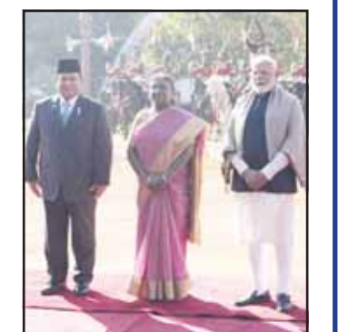
Indonesian President Prabowo Subianto, (left), poses with Indian President Droupadi Murmu, (center), and Indian Prime Minister Narendra Modi at the Indian presidential palace during his ceremonial reception in New Delhi, India on Jan 25.

The agreement signed today in maritime safety and security will