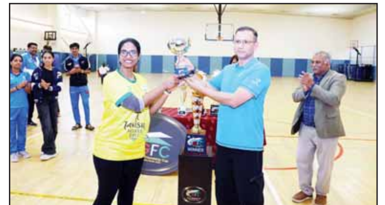
An outstanding player receives award.