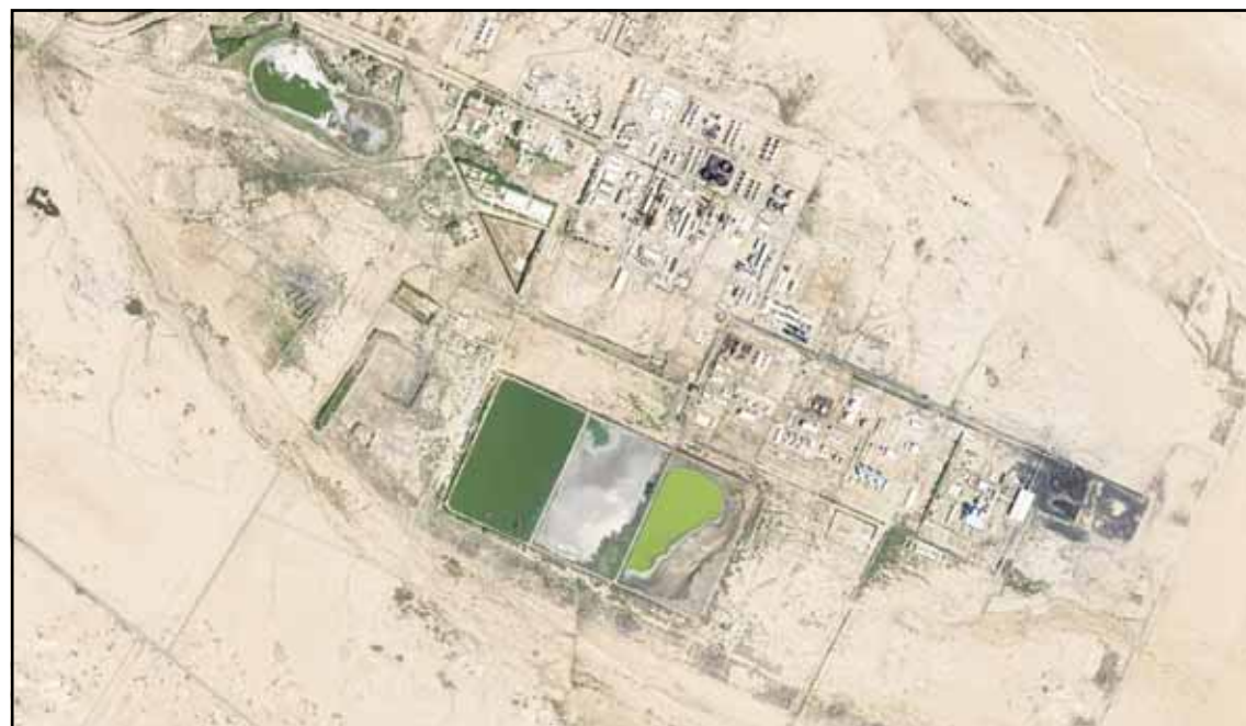
This Planet Labs PBC satellite image shows Sudan's largest oil refinery north of Khartoum, Sudan, on Oct 27, 2024.