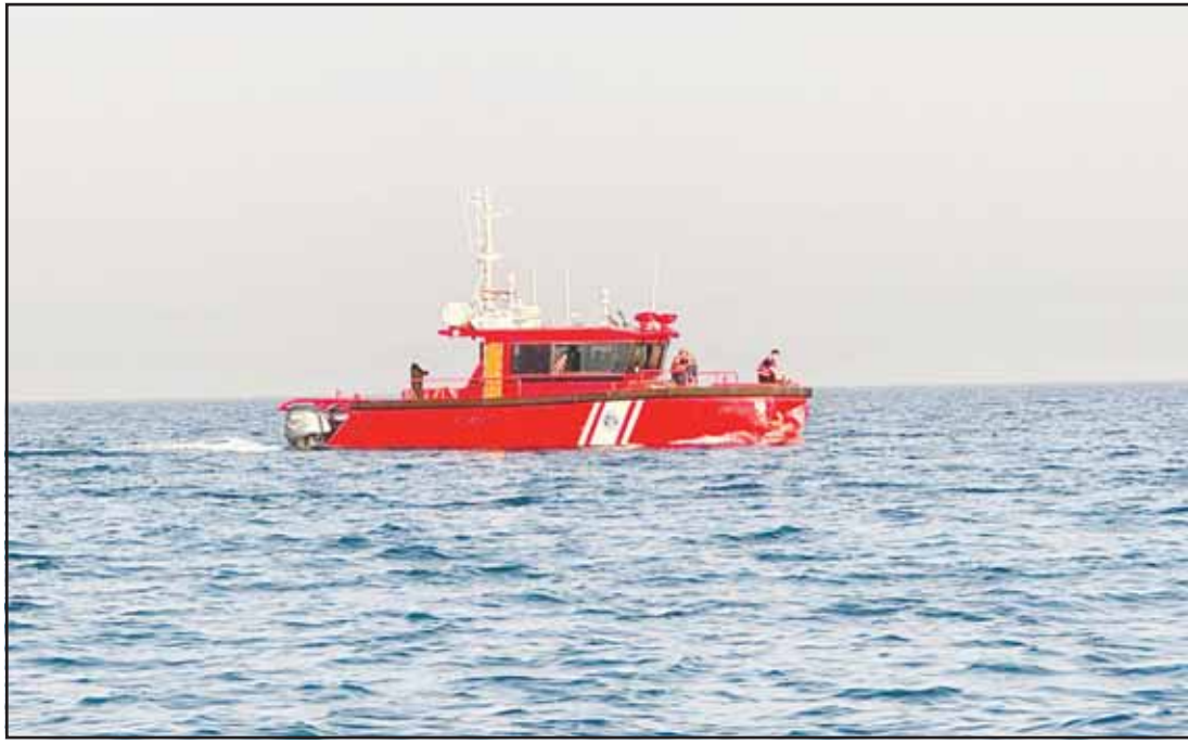
Kuwait Fire Force boat out in the sea looking for the missing citizen following the collision.

-- Compiled by PFX Fernandes / Mahmoud Attiyeh