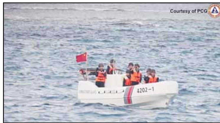
In this image released by Philippine Coast Guard, a Chinese Coast Guard boat sails around Sandy Cay in the South China Sea on Jan 24.

There was no immediate response from Chinese officials. The latest flare-out of the long-sim-