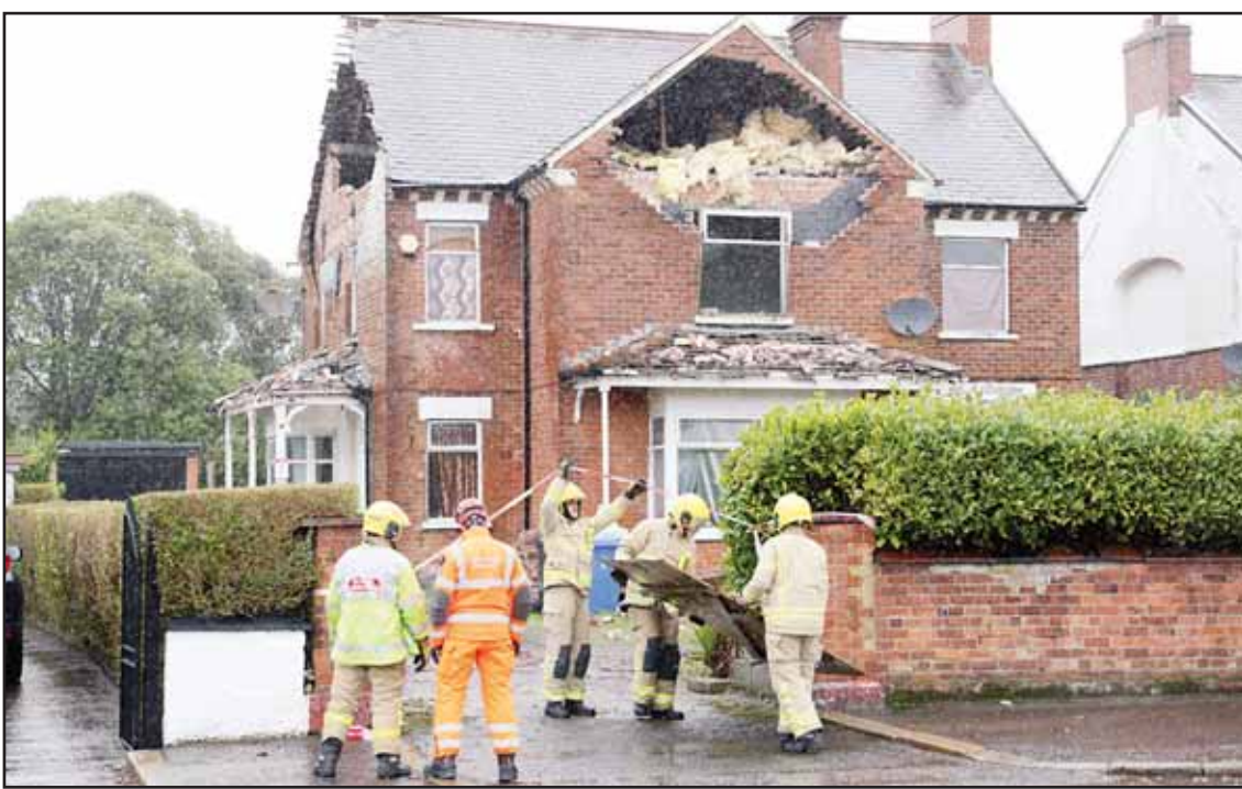
Firemen secure a house that was damaged by the winds of Storm Eowyn that hit the country in Belfast, Northern Ireland on Jan 24.

The federal appeals court said that contrary to Iowa's belief, the state law would likely contradict federal officials' discretion in how to enforce immigration policy and complicate U.S. foreign policy.