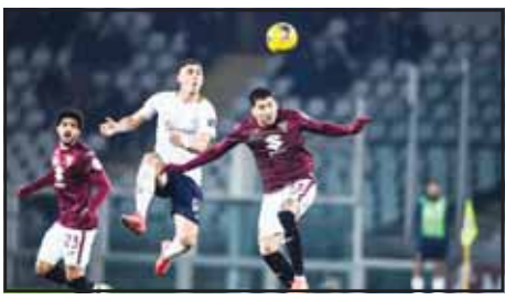
Cagliari's Roberto Piccoli and Torino's Guillermo Maripan, right, in action during the Serie A soccer match between Torino and Cagliari at the Stadio Olimpico Grande Torino in Turin, Italy. Torino won 2-0.