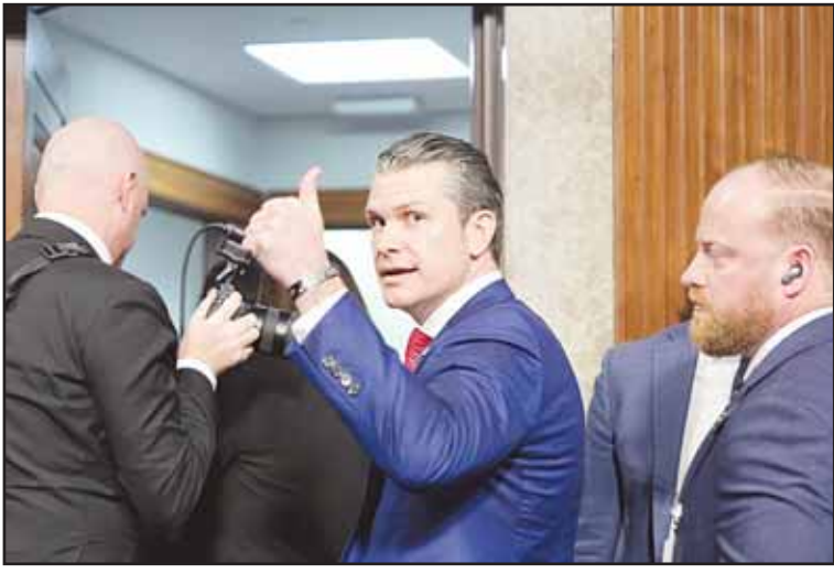
Pete Hegseth, US President-elect Donald Trump's choice to be defense secretary, gives a thumbs up while leaving after his Senate Armed Services Committee confirmation hearing, at the Capitol in Washington on Jan 14.