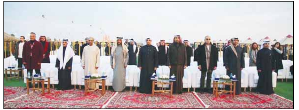
Minister of Information, representatives of GCC embassies and Kuwaiti officials during the Gulf Week event.