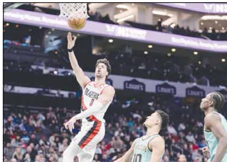
Portland Trail Blazers forward Deni Avdija (8) goes up for a layup past Charlotte Hornets guard Josh Green (10) during the first half of an NBA basketball game in Charlotte, N.C.

Deni Avdija had 18 points and Donovan Clingan added 13 rebounds as the Blazers outscored the