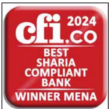
Kuwait International Bank named Best Sharia-Compliant Bank in MENA 2024.

The esteemed judging panel of the magazine selected KIB from a group of nominated banking and financial institutions, recognizing the Bank for its comprehensive range of banking solutions that adhere to Sharia principles, its tailored financial products that meet the unique needs of its customers, its strategic initiatives aimed at enhancing customer experience and operational efficiency, its cutting-edge online and mobile banking platforms, and, locally, its active participation in community development and charitable activities. The panel commended the Bank for its knowledgeable and experienced team, which ensures compliance with the highest standards of Sharia governance, and its leadership in promoting and sustaining Sharia-compliant banking.