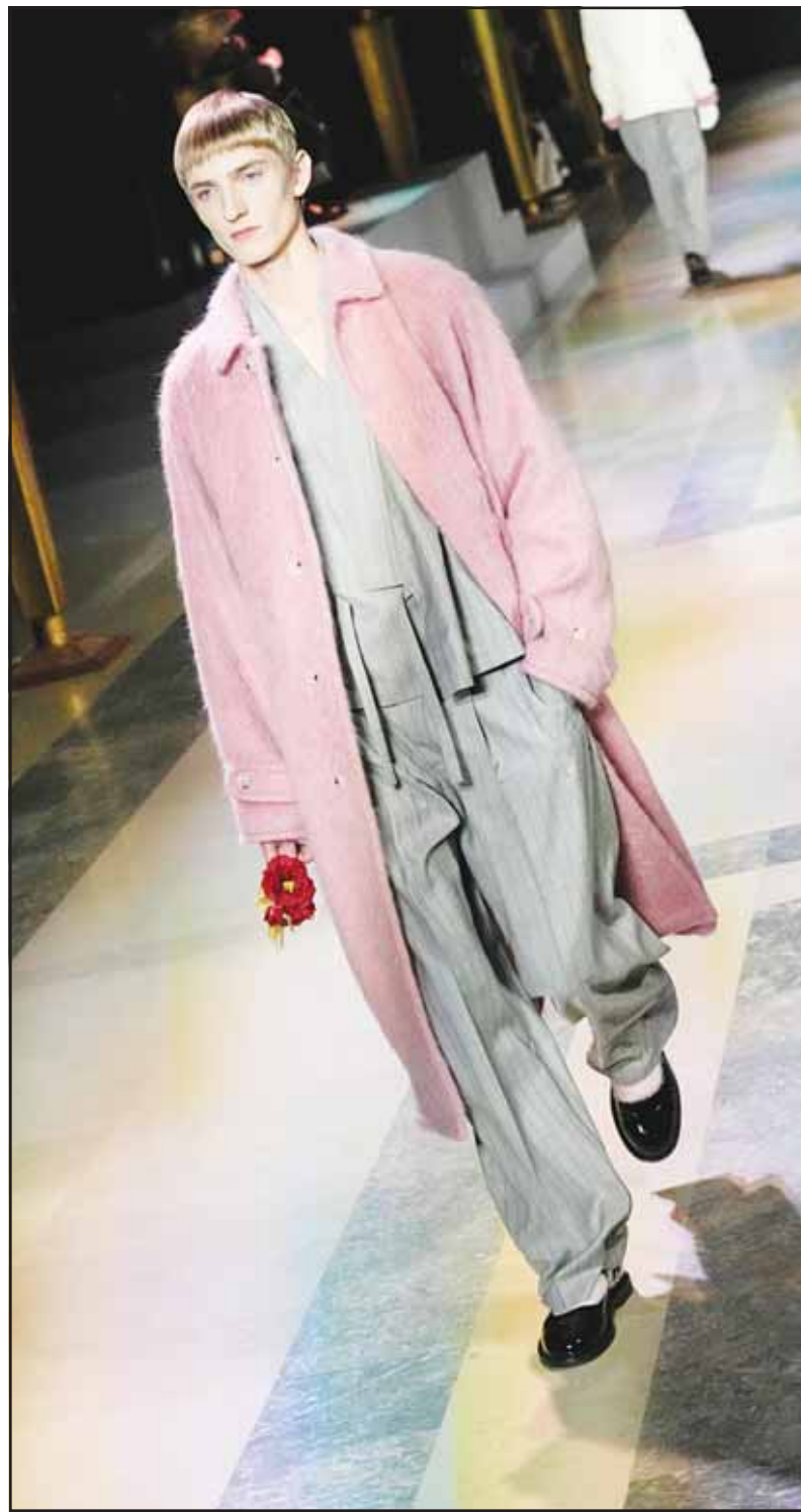
A model wears a creation for the men's Kenzo Fall-Winter 2025-2026 collection, that was presented in Paris, Friday, Jan. 24, 2025.