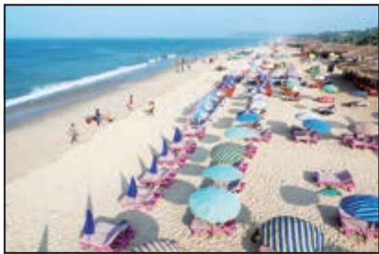
One of the beaches in Goa

Transportation: India's rail network is vast and affordable, and domestic flights are well-connected, making it easy to travel across the country.