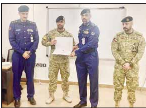
A National Guard member is awarded a certificate after the conclusion of the course.

The expatriate's mobile phone continued ringing even after his death and while the security personnel were dealing with the matter, a hint that the suicide was due to family problems.