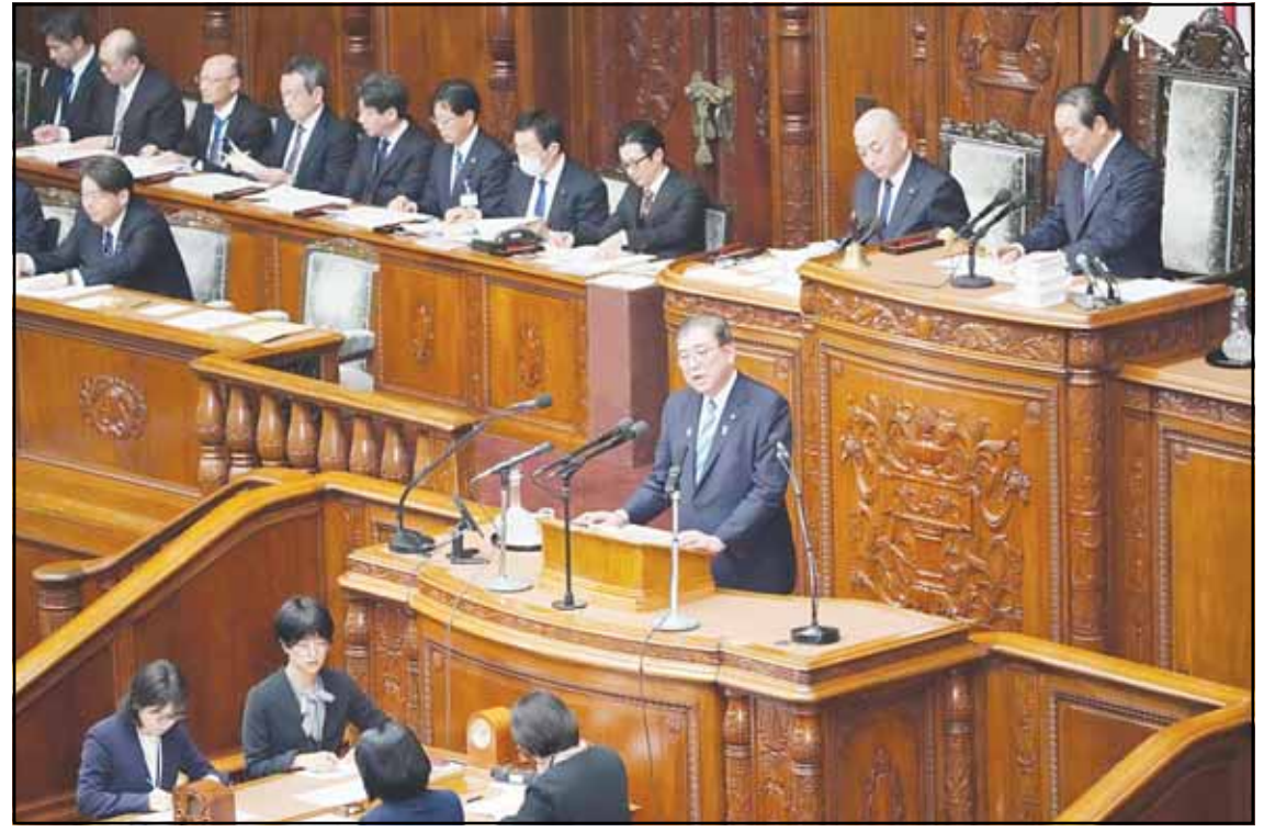
Japan's Prime Minister Shigeru Ishiba delivers a policy speech marking the start of the year's parliamentary session in Tokyo on Jan 24.

Last December, outside the National Assembly where lawmakers voted to impeach Yoon, thousands of people wielded K-pop light sticks costing around $50 from popular bands like BIGBANG, NCT, and Epik High during pro-impeachment rallies.