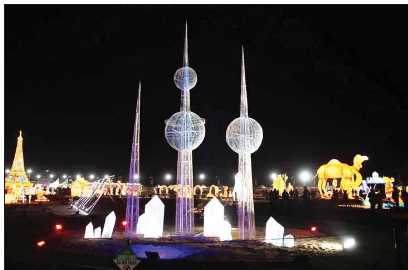
A replica of the Kuwait Towers, illuminated with vibrant lights, stands amidst the dazzling decorations in Subiya, celebrating the Gulf Week event. - See Page 5

Israel's Prison Service later said it had completed the release of 200 Palestinians. They included 121 who had been serving life sentences after being convicted of deadly attacks against Israelis. (AP)