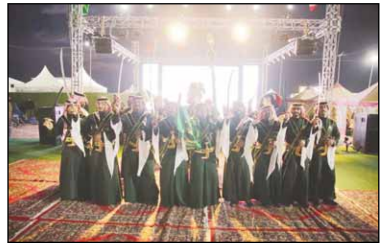
Part of the performances of the Al-Jafr Troupe for Saudi Folk Arts.

nizing this event, which embodies the spirit of pride and honor in Kuwait and its Gulf identity.