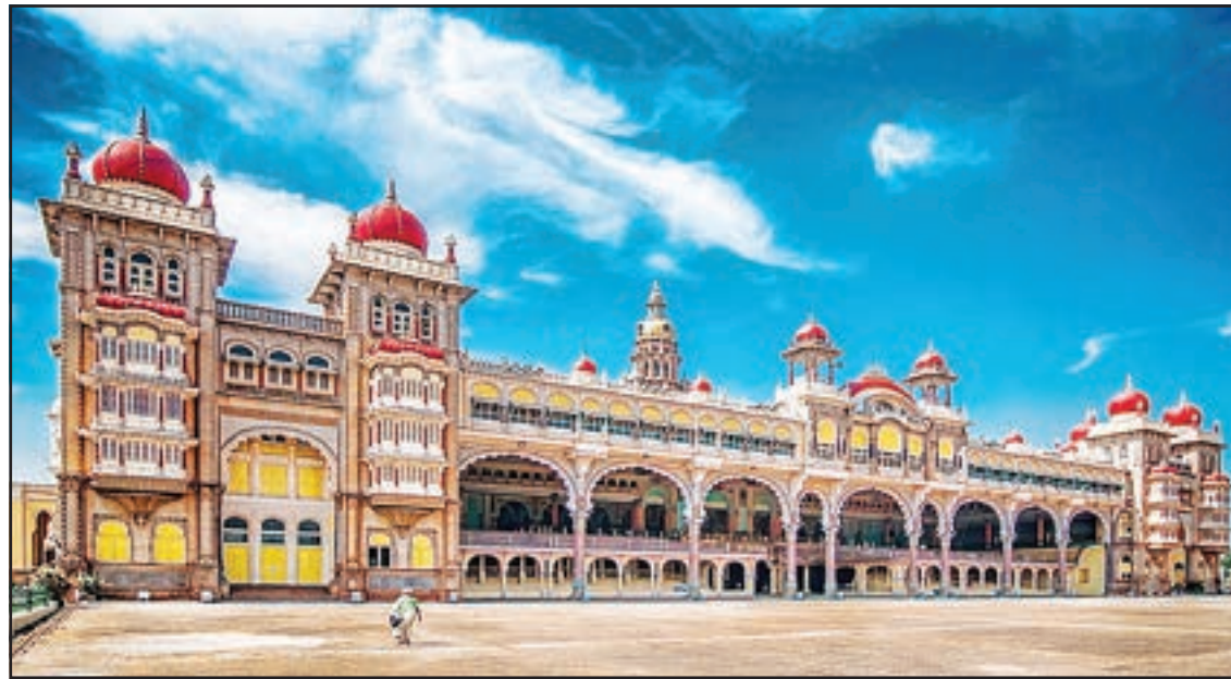
Tipu Sultan Palace Mysore Karnataka

What to Try: Explore Pangong Lake, Nubra Valley,