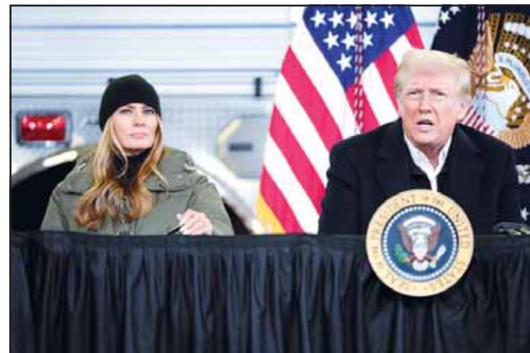
President Donald Trump is briefed on the effects of Hurricane Helene at Asheville Regional Airport in Fletcher, N.C., Friday, Jan. 24, 2025, as First lady Melania Trump looks on.

Then there's housing. Voters are still frustrated by high mortgage