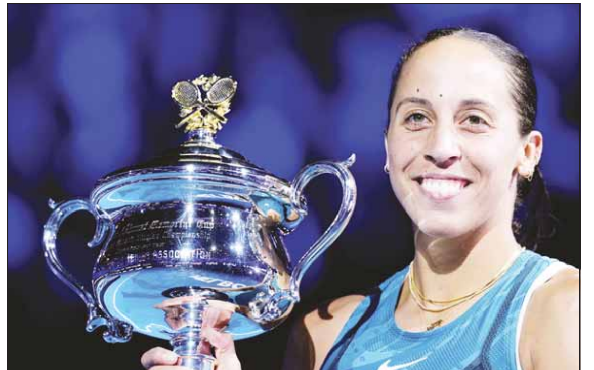
Madison Keys of the U.S. holds the Daphne Akhurst Memorial Cup after defeating Aryna Sabalenka of Belarus in the women's singles final at the Australian Open tennis championship in Melbourne, Australia.