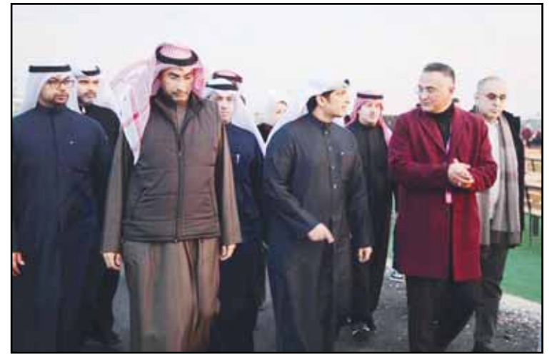
Minister of Information during a tour of the Shining City.

He expressed his thanks and appreciation to the Permanent Committee for National Holidays and Occasions and to all those who contributed to orga-