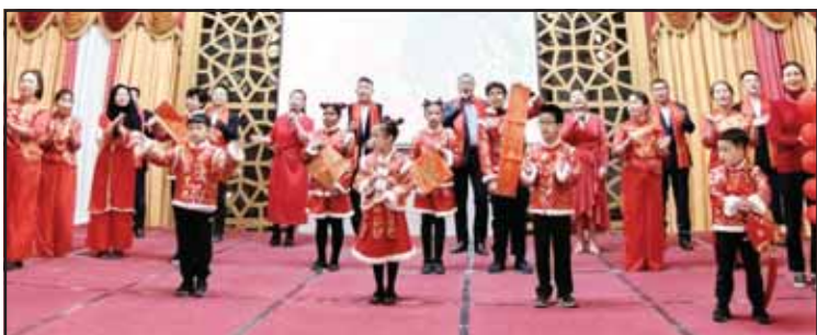
People perform at an event celebrating the Chinese Lunar New Year.