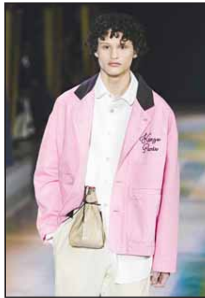
A model wears a creation for the men's Kenzo Fall-Winter 2025-2026 collection.