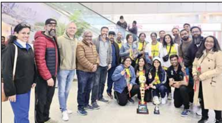
Women's Throwball team receives a grand welcome at Kuwait International Airport.

With this memorable triumph, IDAK has not only brought home trophies but also strengthened the spirit of collaboration and pride within the community.