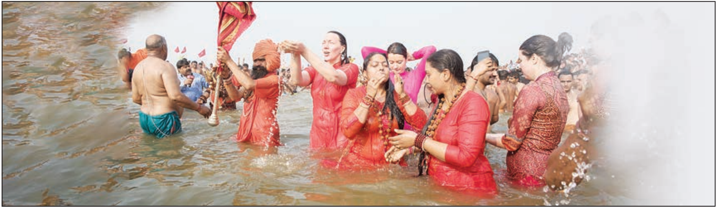
The Maha Kumbh Mela