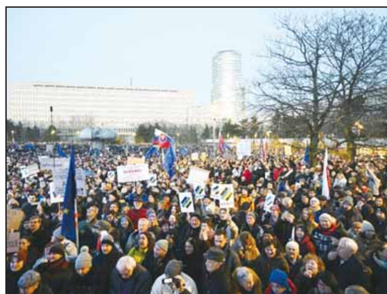
Thousands of protesters gather to oppose the policies of Slovakia's Prime Minister Robert Fico in Bratislava, Slovakia on Jan 24.

No law enforcement officers or hospital staff were injured.