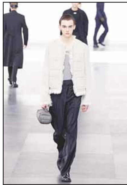
A model presents a creation for men's Fall/Winter 2025-2026 collections by Dior Homme.