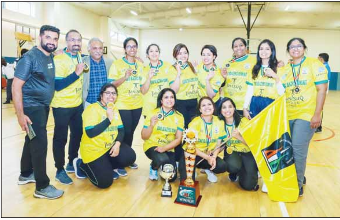
The Women's Throwball champions IDAK Blazers