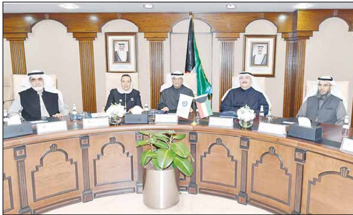
Part of the attendance of the signing of the cooperation agreement between the Ministry of Health and Abdullah Al-Salem University.

This includes access to medical facilities for harnessing state-of-the-art resources for practical training; strengthening scientific and research cooperation and exchanging expertise and resources to enhance healthcare