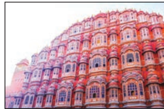
Pink city, Jaipur