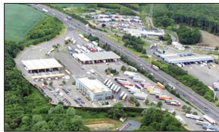
One of the company's gas stations in Europe.

He boasted that this achievement is considered a significant step towards