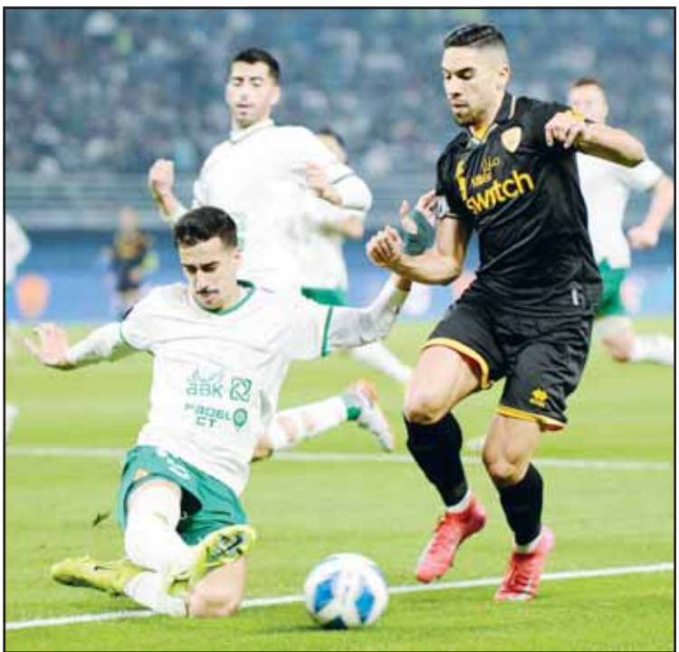
Players vie for the ball during the Super Cup match between Al-Qadsiya and Al-Arabi.

Aqla also shared his preference for a foreign refereeing crew for the final, although he expressed gratitude and respect for local referees.