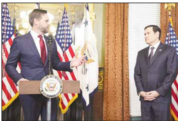
US Vice President JD Vance speaks before swearing in Secretary of State Marco Rubio, (right), in the Vice Presidential Ceremonial Office in the Eisenhower Executive Office Building on the White House campus on Jan 21, in Washington.

Some leading aid organizations also were interpreting the directive as an immediate stop-work order for US-funded aid work globally, a former senior US Agency for International Development official said. Many would likely cease operations immediately so as not to incur more costs, the official said. The official was not authorized to speak publicly and spoke on condition