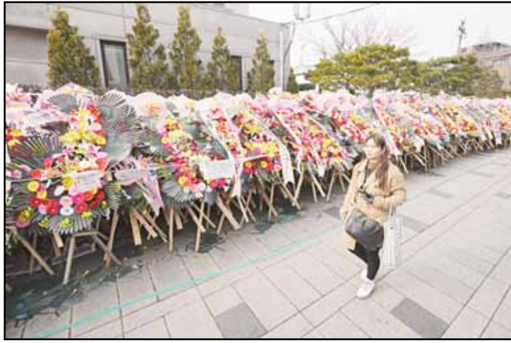
A pedestrian passes by wreaths sent by supporters of impeached South Korean President Yoon Suk Yeol outside of the Constitutional Court in Seoul, South Korea, Jan 14.