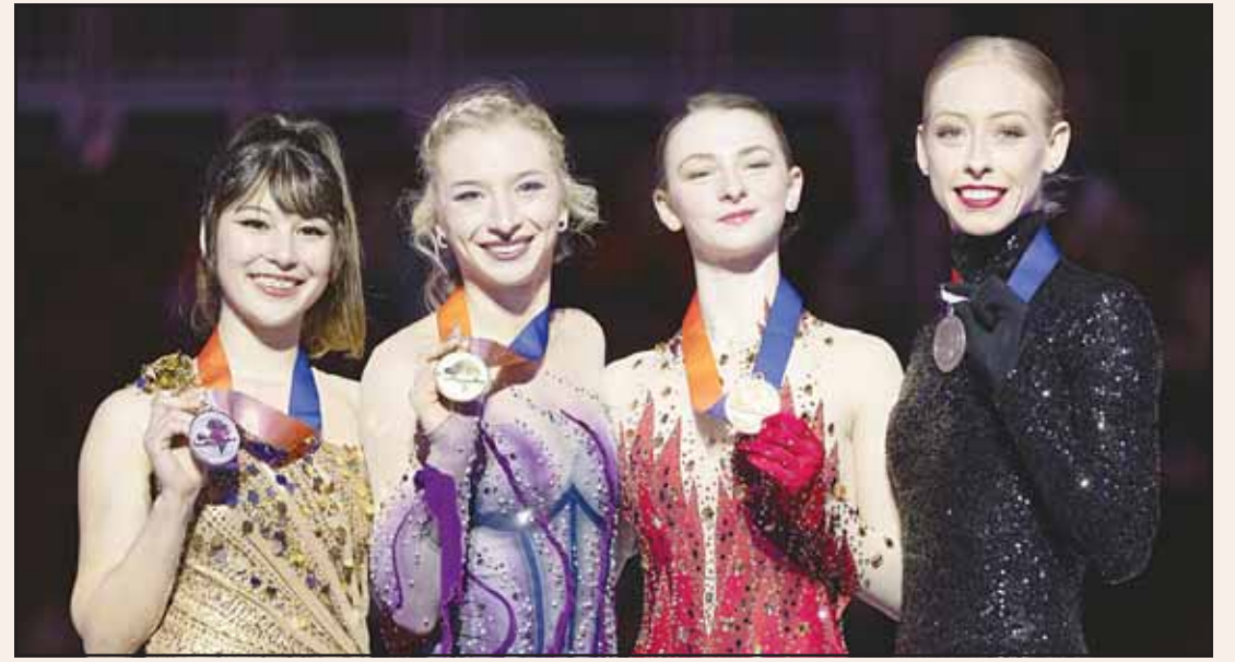
From left: Alysa Lie, Amber Glenn, Sarah Everhardt and Bradie Tennell pose with their medals at the U.S. Figure skating championships in Wichita, Kan.

They are going for their fourth straight national title and sixth overall, which would tie the U.S. record held by Meryl Davis and Charlie White. And this one would come 11 years after Chock and Bates first stepped atop the podium.