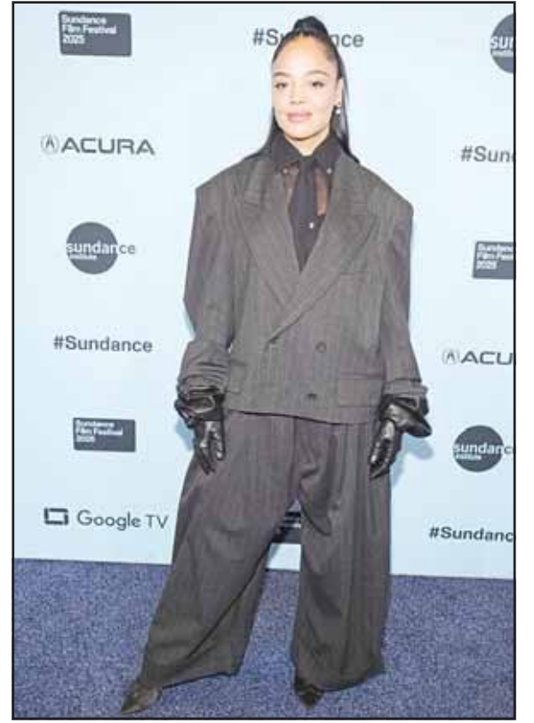
Tessa Thompson attends the Celebrating Sundance Institute gala during the Sundance Film Festival on Friday, Jan. 24, 2025, at Grand Hyatt Deer Valley in Park City, Utah.