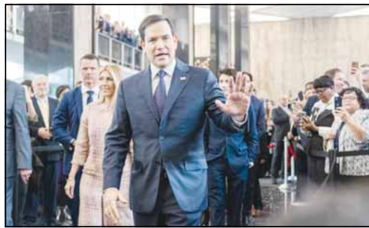
US Secretary of State Marco Rubio greets people as he arrives to speak to State Department staff followed by his family, at the State Department on Jan 21 in Washington.

The Chinese coast guard ships have approached up to 60 nautical miles (111 kilometers) from the Philippines coast in recent weeks, well within the country's exclusive economic zone.