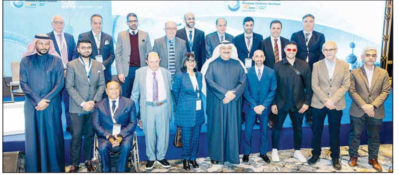
A group photo of conference participants.