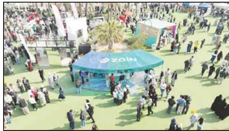
Zain's booth at Qout Market.

Zain takes pride in being one of the earliest supporters of this community-driven initiative over the years, a platform that consistently achieves remarkable success each season. The event is highly regarded by the Kuwaiti community, bringing people together in an inspiring environment