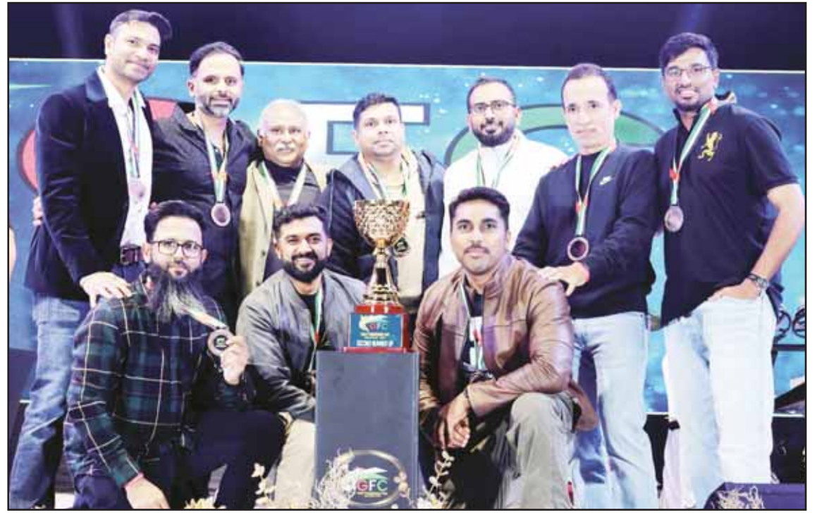
Second runner-up in men's cricket.

KUWAIT CITY, Jan 25: The Indian Dentists' Alliance in Kuwait (IDAK) has made Kuwait proud by clinching major victories in the Gulf Friendship Cup 2025 Throwball and Cricket tournaments held in Abu Dhabi. Competing against teams of doctors and their families from across the Gulf, IDAK emerged as champions in Women's Throwball and secured the 2nd Runner-Up position in Men's Cricket.