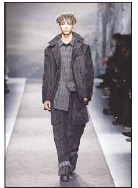
A model presents a creation by Yohji Yamamoto during the Paris Fashion Week in Paris, France.