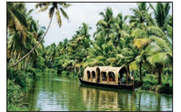
Houseboat cruise in Kerala backwaters