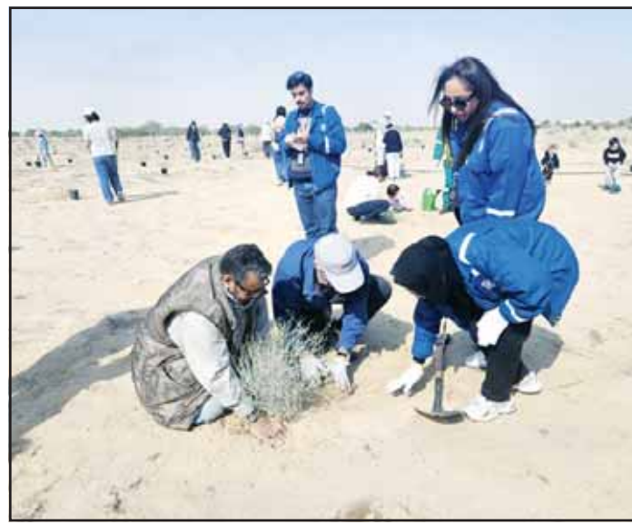
Korean Embassy staff and KOC personnel planting trees at the Abdali Natural Reserve marking the Go Green Kuwait Event.