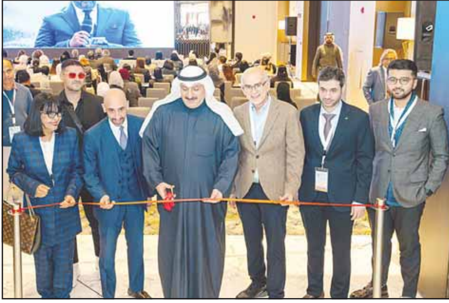
The Minister of Health opens the exhibition accompanying the First International Conference on Advanced Diabetes Care.