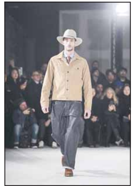
A model wears a creation as part of the men's Junya Watanabe Fall-Winter 2025-2026 collection.