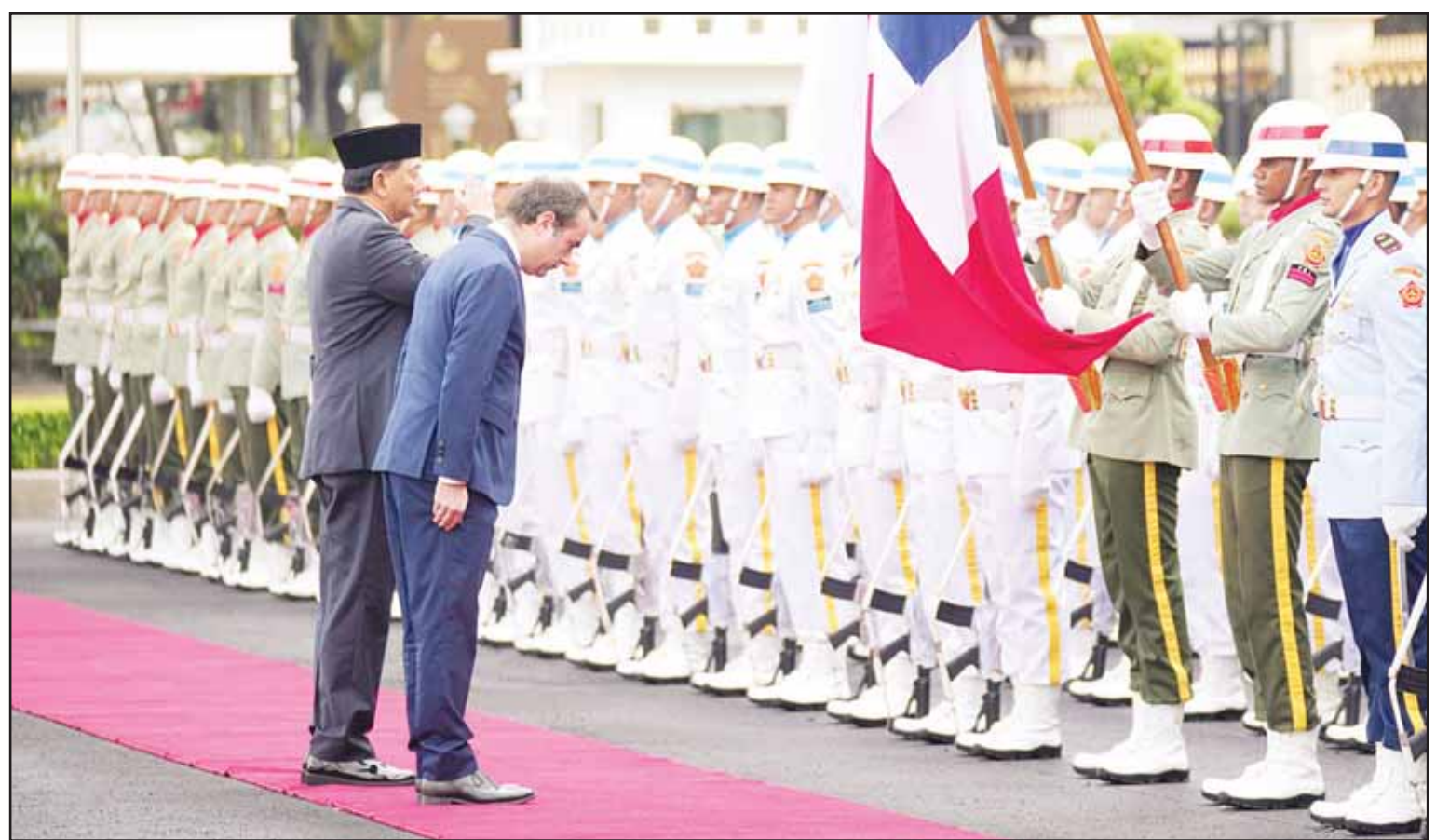
France's Defense Minister Sebastien Lecornu, (right), and Indonesian Defense Minister Sjafrie Sjamsoeddin salute the national flags as they inspect honor guards during the welcoming ceremony prior to their meeting in Jakarta, Indonesia on Jan 31.

The South China Sea contains crucial shipping lanes, abundant fish stocks and undersea mineral resources. Efforts between China and the Association of Southeast Asian Nations to establish a code of conduct to prevent conflicts have seen little progress.