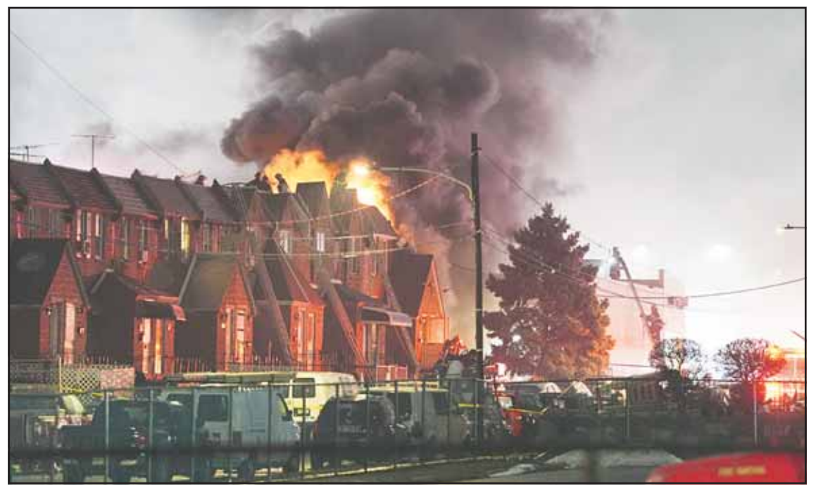
First responders work the scene after a small plane crashed in Philadelphia on Jan 31.