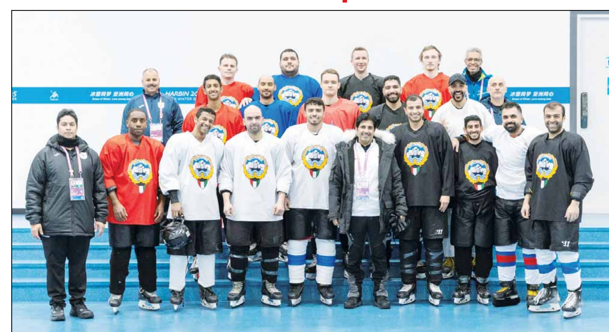
A group photo of the ice hockey team after its training.

Tickets on sale include 94 sessions of ice events, including ice hockey, speed skating, short track speed skating, figure skating, and curling. Starting at the same time on Saturday, tickets for all 12 sessions of snow events, including