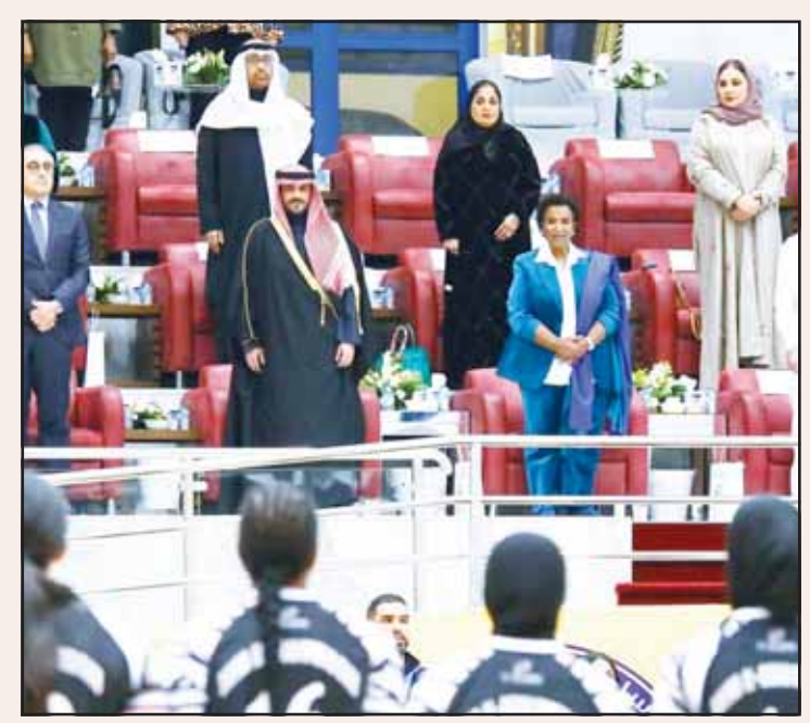
Mubarak Al-Kabeer Governor Sheikh Sabah Badr Al-Sabah opens the tournament in the presence of Sheikha Naima Al Ahmad

Salwa Al-Sabah vs. Swiss Geneva The tournament continues to showcase intense competition, with teams from around the world vying for top honors.