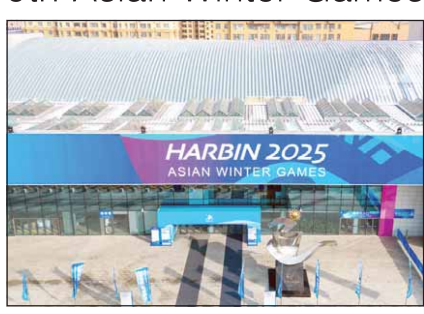
This aerial photo taken on Jan. 27, 2025 shows Harbin Ice Hockey Arena in Harbin, northeast China's Heilongjiang Province.

HARBIN, China, Feb 1, Athletes from the United Arab Emirates (UAE) are gearing up to compete in the 9th Asian Winter Games, scheduled to be held in Harbin, China, from February 7-14.