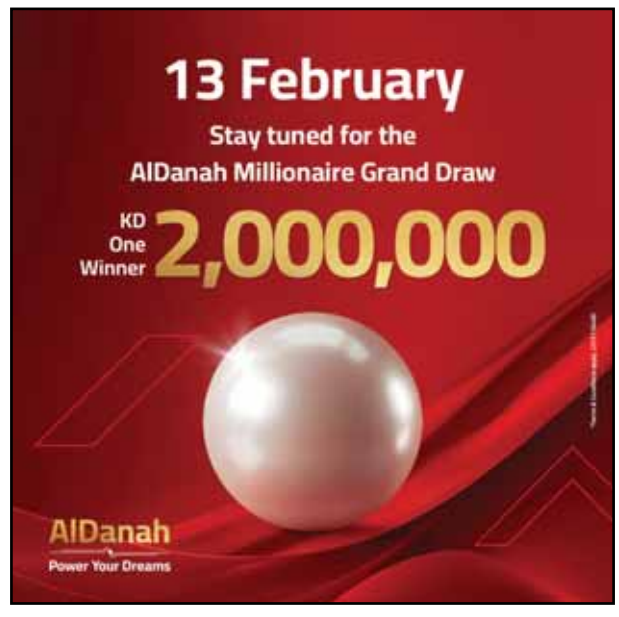
AlDanah Millionaire Grand Draw.

Gulf Bank's 2025 prize schedule for the AlDanah Millionaire account offers an array of exciting rewards. Leading the lineup is the grand prize of KD 2 million, followed by a semiannual draw with a KD 1 million prize. Additionally, two quarterly draws, each worth KD 100,000, will reward 100 winners with KD 1.000 each. The monthly draw also grants KD 1,000 to 10 winners each month, contributing