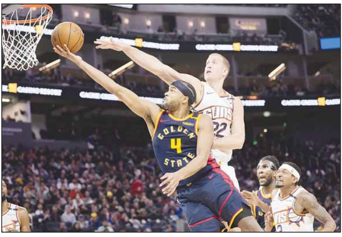
Golden State Warriors guard Moses Moody (4) shoots against Phoenix Suns center Mason Plumlee during the second half of an NBA basketball game in San Francisco.