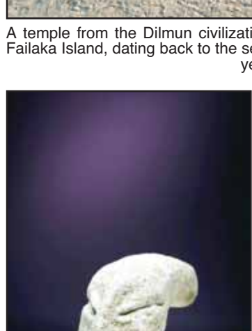
A human head made of clay from the site of Bahra in the Subiya area north of Kuwait Bay, dating back to the sixth millennium BC (5500 BC -7,500 years ago).

Other important discoveries were found after excavation work in "Tal Al-Bahitha" in Kuwait City, which also point