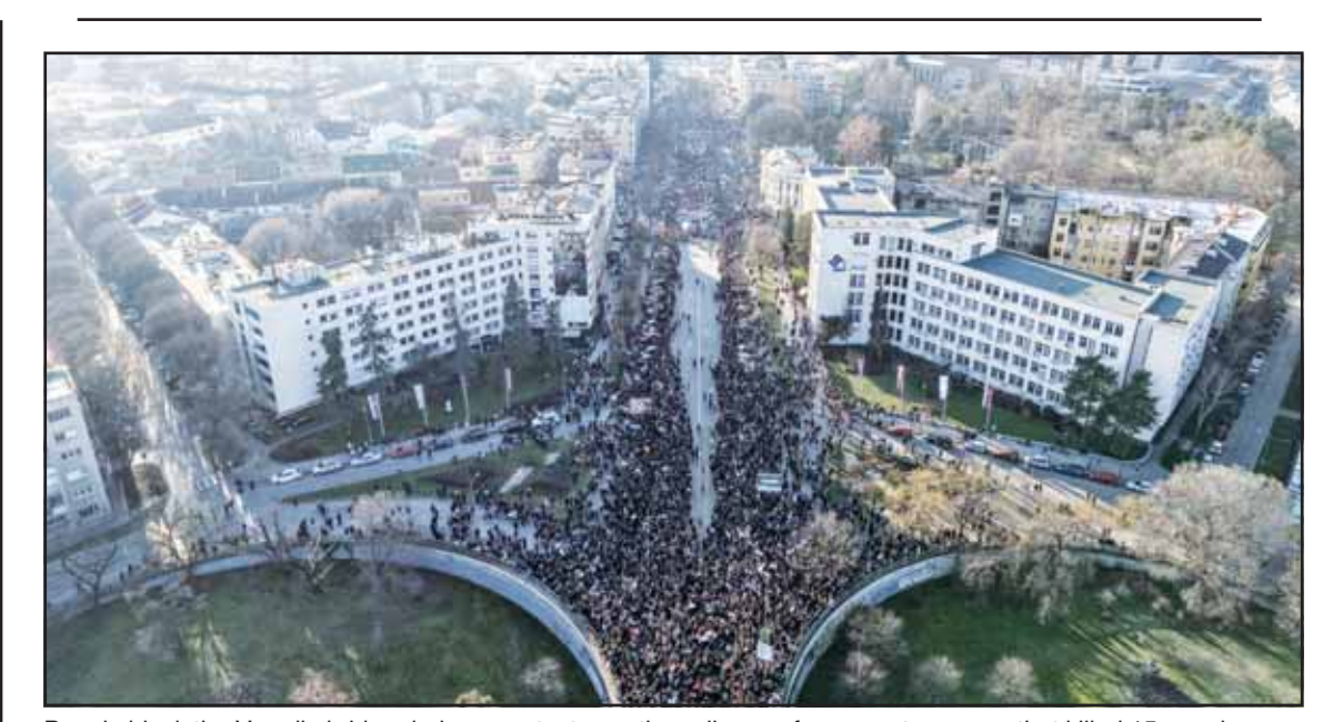
People block the Varadin bridge during a protest over the collapse of a concrete canopy that killed 15 people more than two months ago, in Novi Sad, Serbia on Feb 1.

He occasionally refused to sign bills into law due to constitutional concerns and didn't always make himself popular with the government of Chancellor Angela Merkel, whose choice he was for the presidency - a largely ceremonial job but often seen as a source of moral authority