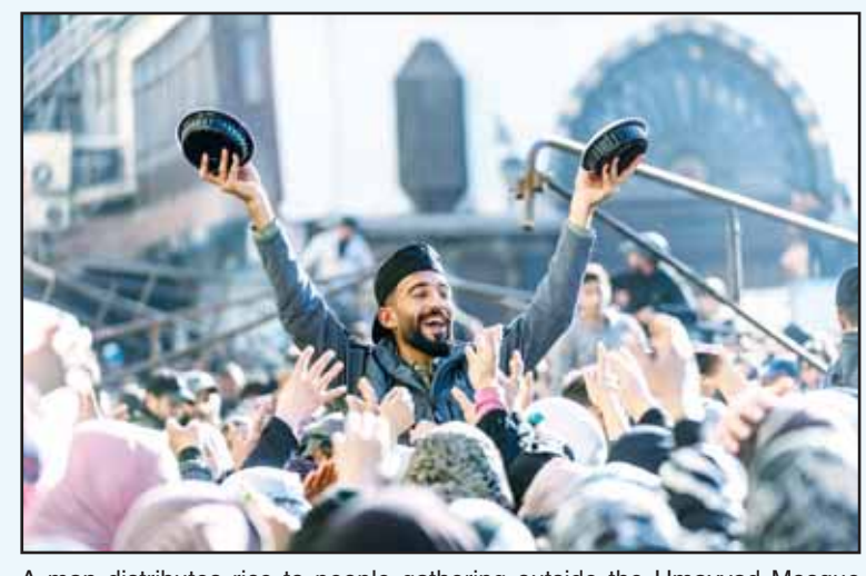
A man distributes rice to people gathering outside the Umayyad Mosque during Friday prayers in Damascus, Syria, Friday Jan. 10, 2025.