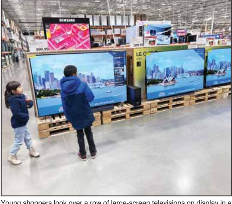
Young shoppers look over a row of large-screen televisions on display in a Costco warehouse Thursday, Dec. 19, 2024, in Denver.

Wednesday's report also showed persistent inflationary pressure at the end of the 2024. The Federal Reserve's favored inflation gauge called the personal consumption expenditures index, or PCE - rose at a 2.3% annual pace last quarter, up from 1.5% in the third quarter and above the Fed's 2% target. Excluding volatile food and energy prices, so-called core PCE inflation was 2.5%, up from 2.2% in the July-September quarter.