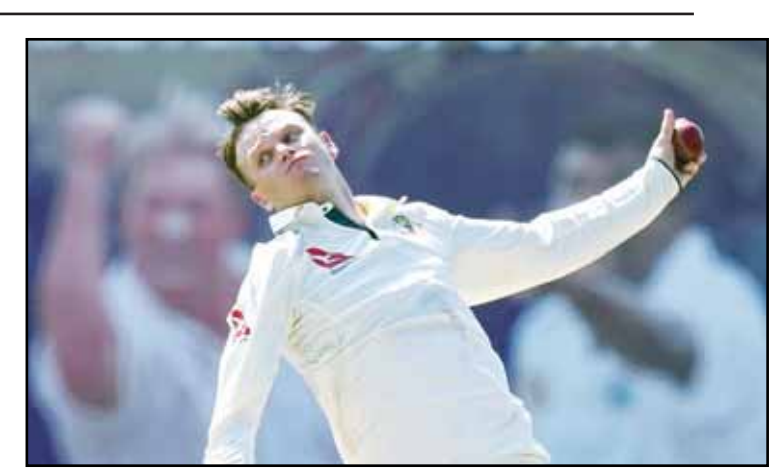
Australia's Matthew Kuhnemann bowls a delivery during day four of the first test cricket match between Sri Lanka and Australia in Galle, Sri Lanka.