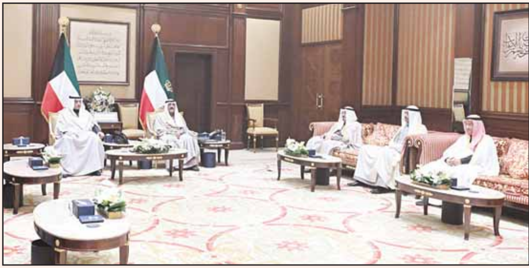
His Highness the Amir, alongside His Highness the Crown Prince, receives His Highness the Prime Minister, and the newly-appointed Defense Minister, as the latter takes the oath of office.