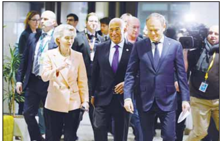
European Commission President Ursula von der Leyen, (left), European Council President Antonio Costa, (center), and Poland's Prime Minister Donald Tusk arrive at the European Council building after an EU summit in Brussels on Feb 3.

Stoltenberg and Gahr Store appeared together at an event in Oslo on Tuesday, where the prime minister was presenting his new team, but Gahr Store didn't explicitly mention Stoltenberg's new job.