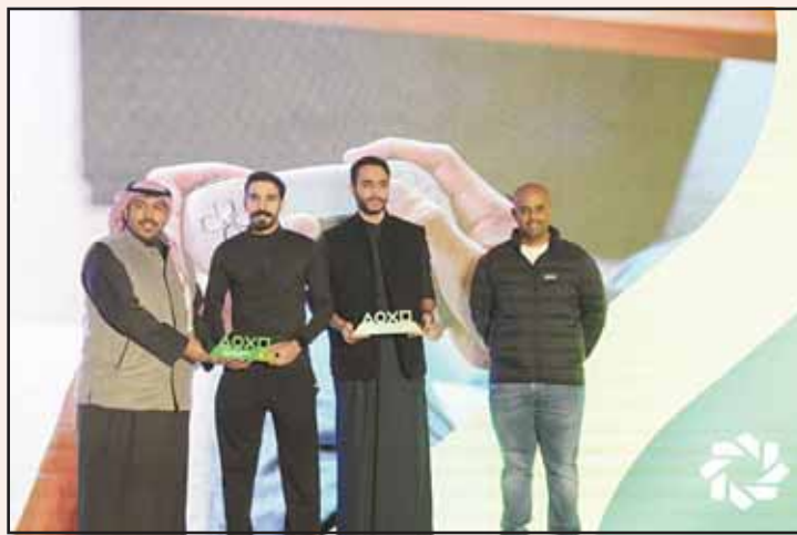
The winning team being honored.