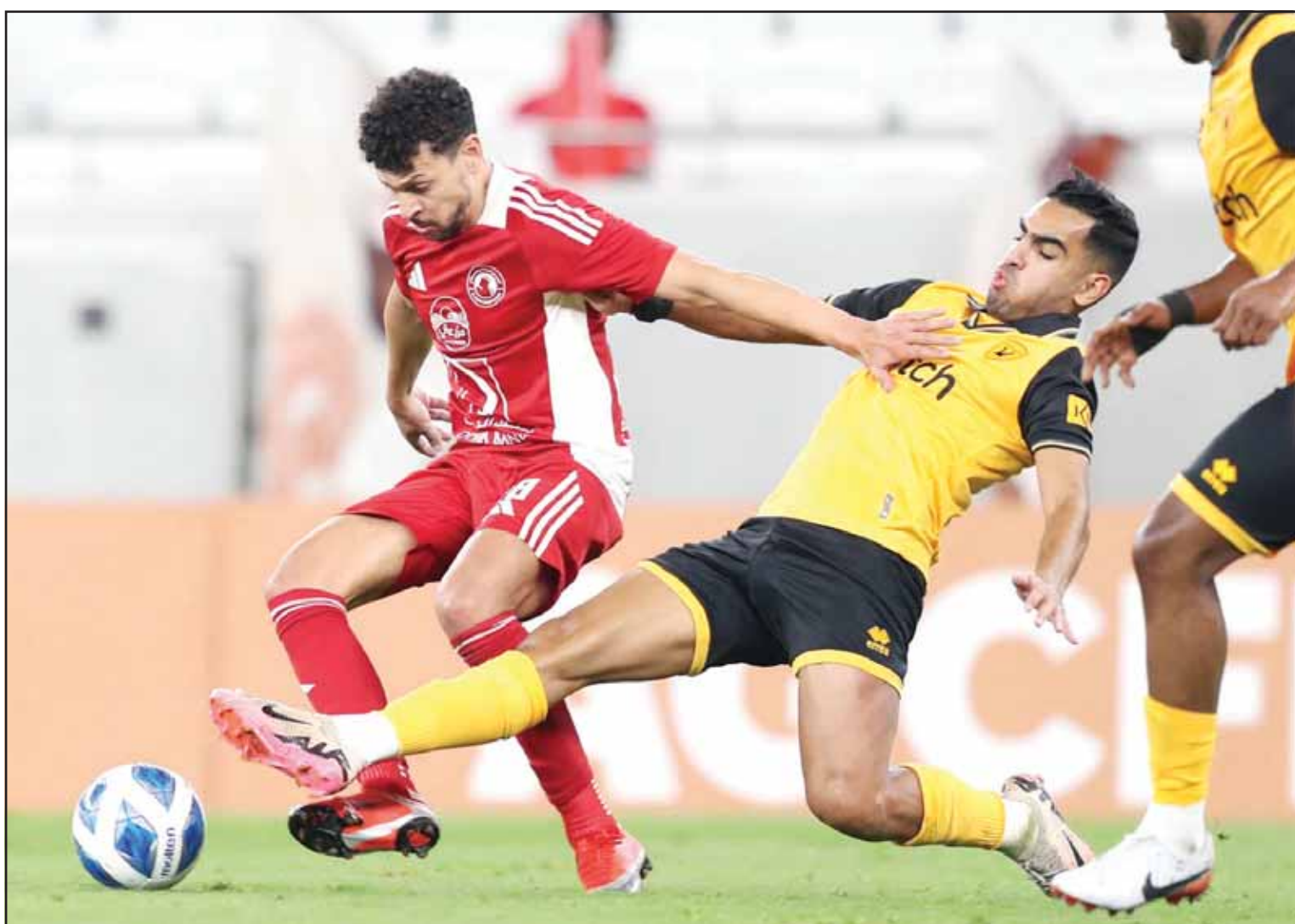
Al-Qadisiya player makes a tackle during a match.