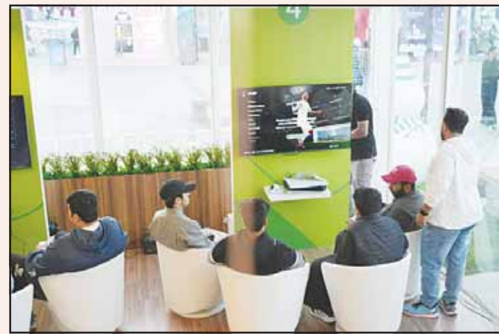
FC 2025 PlayStation tournament for Hesabi customers in progress.

Event in collaboration with Kuwait Esports Committee