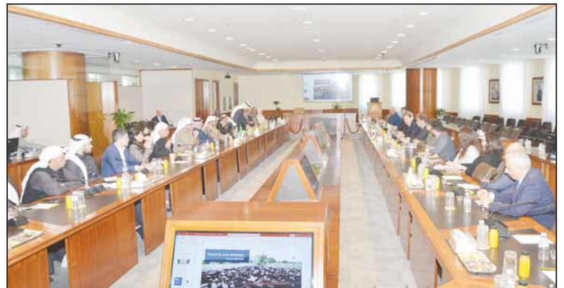
Kuwait Chamber welcomes Brazilian economic delegation.

The Major 50 Index also recorded an increase of 48.86 points, or 0.67%, settling at 7,293.33 points. A total of 292.4 million shares changed hands in 6,968 transactions, with a trading value of 52.6 million dinars ($162 million).