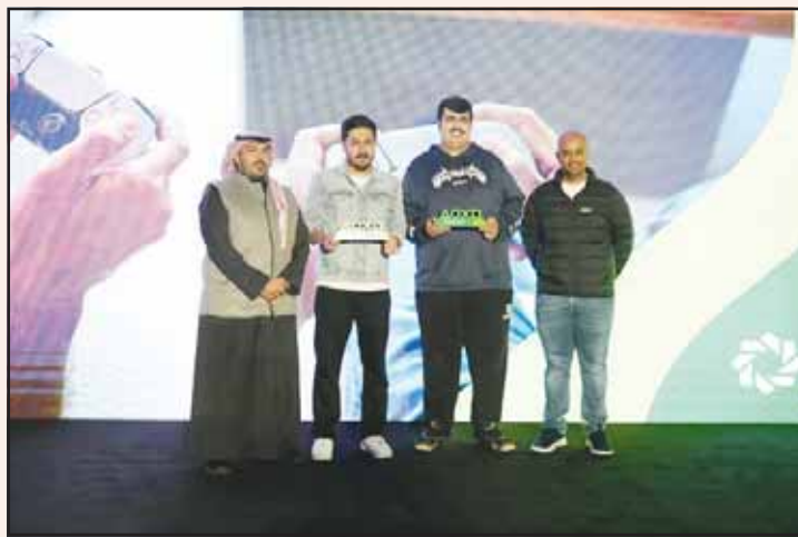
The second place team honored.