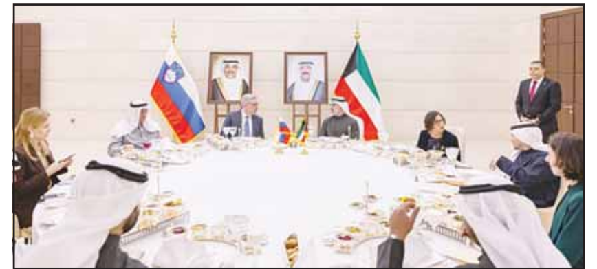
Assistant Minister of Foreign Affairs and State Secretary at the Ministry of Foreign Affairs and European Affairs of the Republic of Slovenia.

Tel: +973 17701201 - Ext. 351 | Email: reservation@albander.com | www.albander.com | @albanderhotelandresort