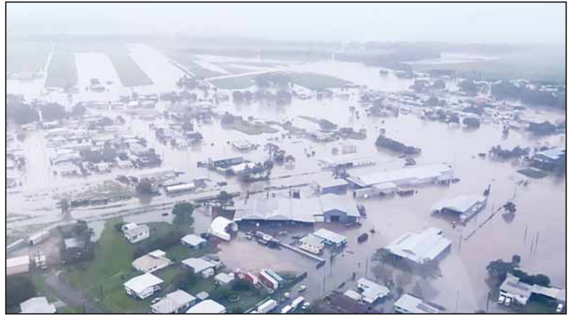
Emergency alerts have been issued for multiple areas in and around Townsville, with floodwaters rising for the past three days. Queensland's Premier David Crisafulli has said more flooding is likely.