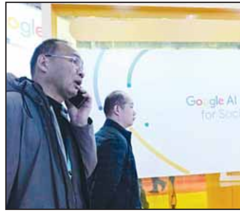
Visitors pass by a Google booth promoting Artificial Intelligence at a supply chain expo in Beijing, Wednesday, Nov. 27, 2024.

The impact on U.S. exports may be limited. Though the U.S. is the biggest exporter of liquid natural gas globally, it does not export much to China. In 2023, the U.S. exported 173,247 million cubic feet of LNG to China, representing about