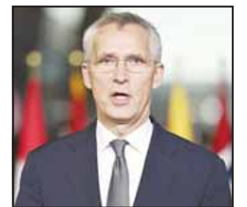
NATO Secretary General Jens Stoltenberg makes statements during a transition ceremony at NATO headquarters in Brussels, Belgium on Oct 1, 2024.

That left current Prime Minister Jonas Gahr Store, the leader of Stoltenberg's center-left Labor Party, with several Cabinet posts