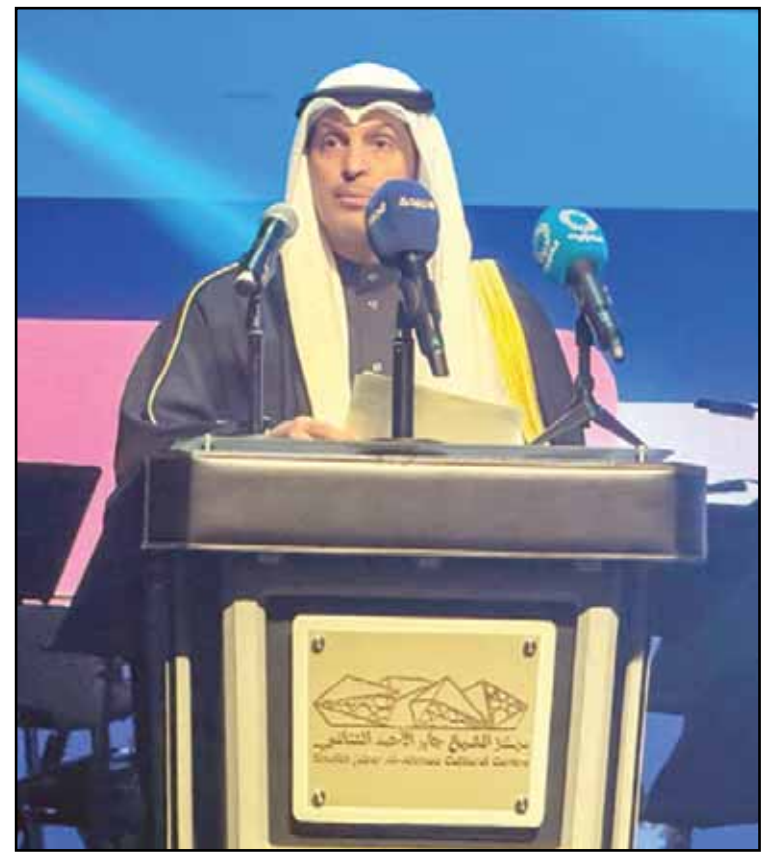
Minister of Information delivers a speech.

The festival's activities will continue until February 12, and will combine arts, music, literature, and intellectual seminars.