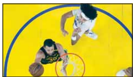
Golden State Warriors guard Stephen Curry, bottom, shoots against Orlando Magic guard Anthony Black during the first half of an NBA basketball game in San Francisco. Warriors won 104-99. — See Page 14