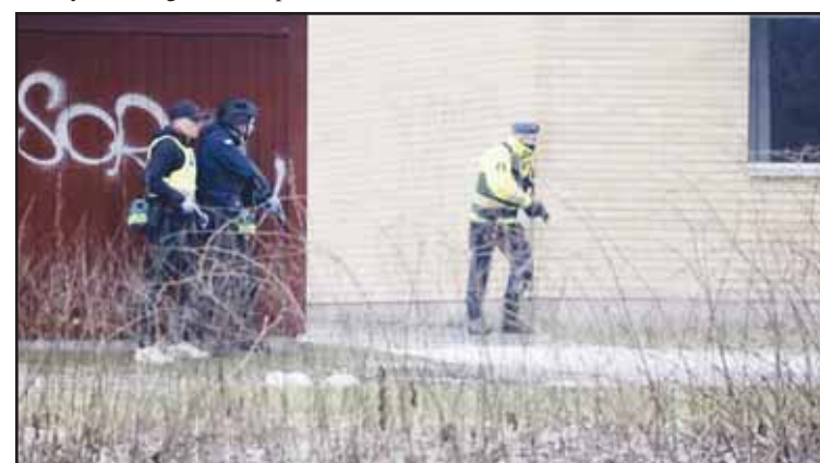
Police at the scene of an incident at Risbergska School, in Örebro, Sweden on Feb 5.

school were evacuated following the shooting. "The reports of violence in Örebro are very serious. The police are on site and the operation is in full swing," Justice Minister Gunnar Strömmer told TT.