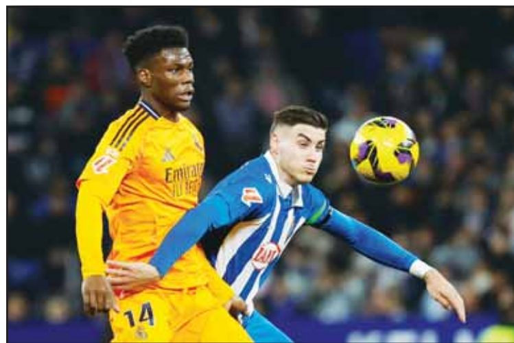
Real Madrid's Aurelien Tchouameni, left, challenges for the ball with Espanyol's Roberto Fernandez during a Spanish La Liga soccer match between Espanyol and Real Madrid at the Lluís Companys Olympic Stadium in Barcelona, Spain.

The La Liga leader sent an official complaint to the Spanish Football Federation (RFEF) complaining about the "culmination of a system of refereeing that has lost all credit, in which decisions against Real Madrid have reached a level of manipulation and adulteration of the competition."