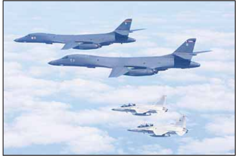
Two Philippine Air Force FA-50 fighter jets fly with two U.S. Air Force B-1 bomber aircraft during a joint patrol and training over the South China Sea on Feb 4.

All those aboard the Philippine air force NC-212i turbo-prop transport plane were unharmed, the Philippine military said.