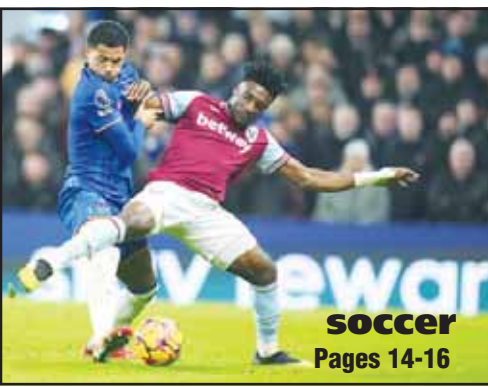
Soccer Pages 14-16