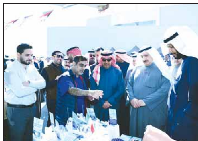
Farwaniya Governor Sheikh Athbi Nasser Al-Athbi Al-Sabah and Minister of Health Dr. Ahmad Al-Awadhi visit a stall.

Al-Mutawa called for strengthening collaboration between the public and private sectors to support innovation and human capital development.