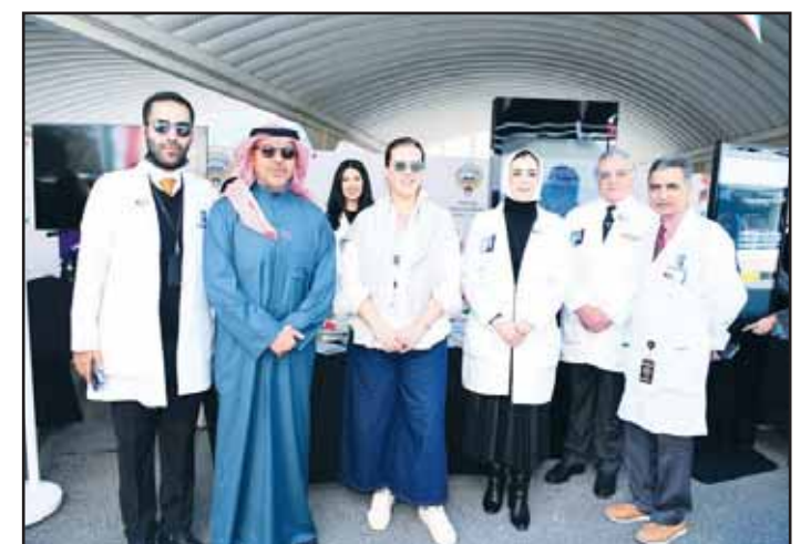
Farwaniya Governor Sheikh Athbi Nasser Al-Athbi Al-Sabah visits a medical sector stall at the exhibition.