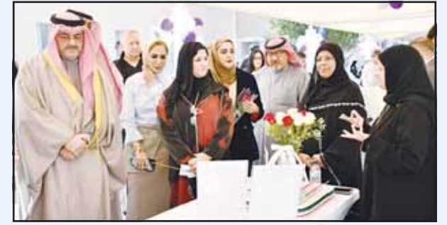
Capital Governor Sheikh Abdullah Salem Al-Ali Al-Sabah during a tour of the exhibition.