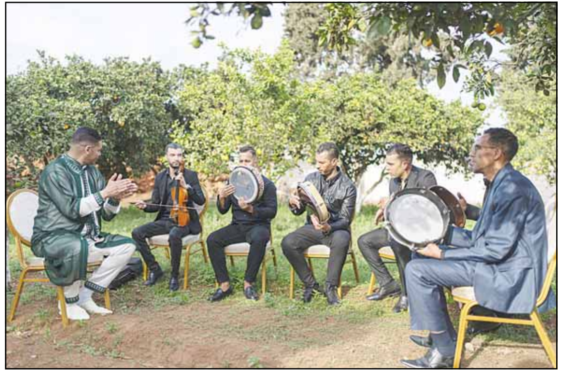
A music band prepares for a traditional performance known as Aita, in Sidi Yahya Zaer, south of the capital Rabat, Morocco, Monday, Jan. 27, 2025.