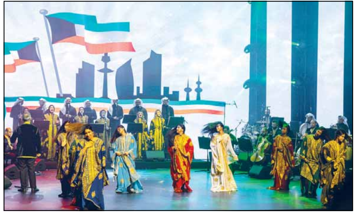
Part of the opening ceremony

Beyond its national initiatives, the Kuwait Fund for Arab Economic Development (KFAED) actively supports healthcare institutions in various countries to curb the spread of cancer by providing appropriate treatments and supporting people with the disease, especially Syrian refugees in Jordan and Lebanon.