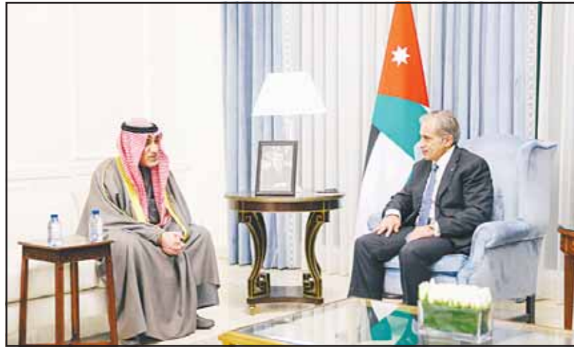
Jordanian Prime Minister and Minister of Defense, Dr. Jafar Hassan receives Kuwait's First Deputy Prime Minister, Minister of Defense and Minister of Interior Sheikh Fahad Yousef Al-Sabah.