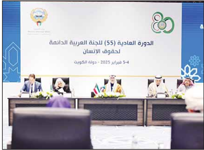
Deputy Foreign Minister Ambassador Sheikh Jarrah Jaber Al-Ahmad Al-Sabah speaking at the 55th regular session of the Permanent Arab Committee for Human Rights.