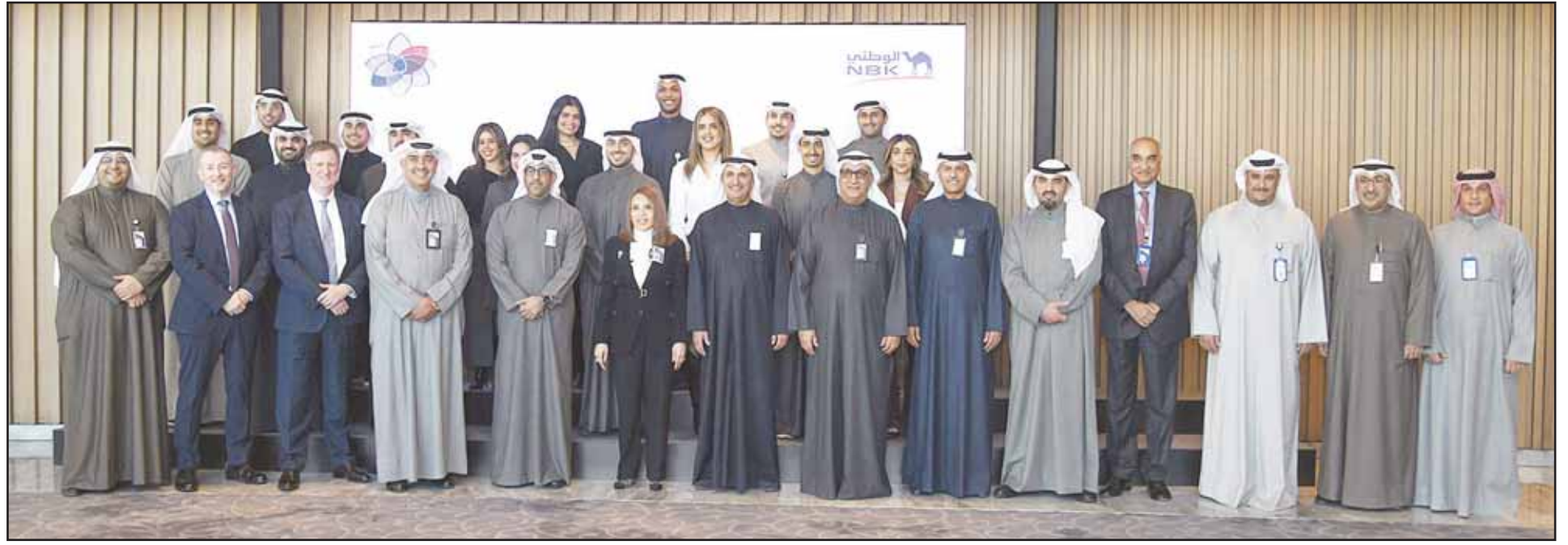
The Bank's Executive Management during the closing ceremony of the Moody's Credit Certificate Program.

Approximately 55 trainees participated in the program, divided into three groups at intermediate and advanced levels. Participants represented various departments across the bank, including the Consumer Banking Group, Risk Management Group, Private Banking Group, Corporate Banking Group, International