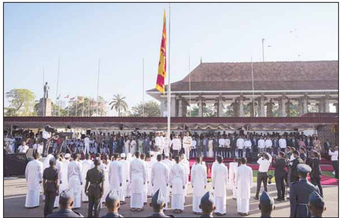
Sri Lankan President Anura Kumara Disanayake, center, hoists the Sri Lankan national flag during the country's 77th Independence Day ceremony in Colombo, Sri Lanka on Feb 4.

Foreign ministers from the Group of Seven advanced economies, or G7, urged parties in the conflict to return to negotiations. In a statement on Monday, they called for a "rapid, safe and unimpeded passage of humanitarian relief for civilians."