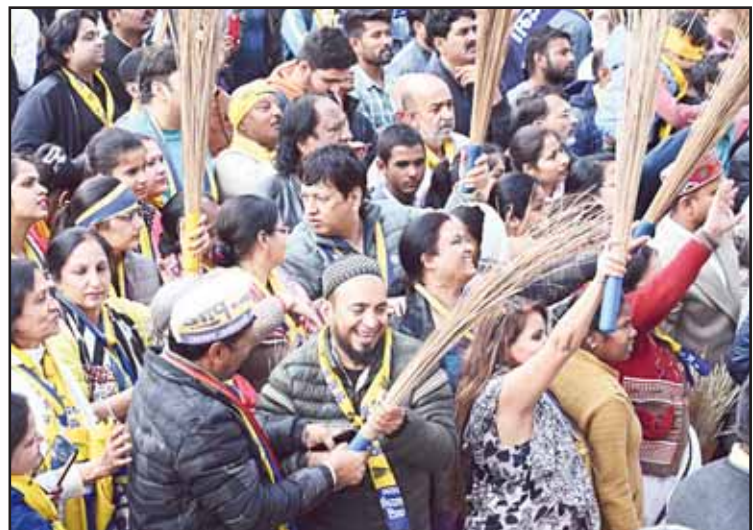
Supporters of Aam Aadmi Party (AAP) carry brooms, their party's symbol, during a show of their party's national convener Arvind Kejriwal as they campaign for Delhi state election, in New Delhi, India on Feb 3.

Kejriwal was, however, arrested last year along with two key leaders of his party ahead of national elections on charges of receiving bribes from a liquor distributor. The accusations have been consistently denied as part of an alleged political conspiracy. The Supreme Court allowed the release of Kejriwal and other ministers on bail.