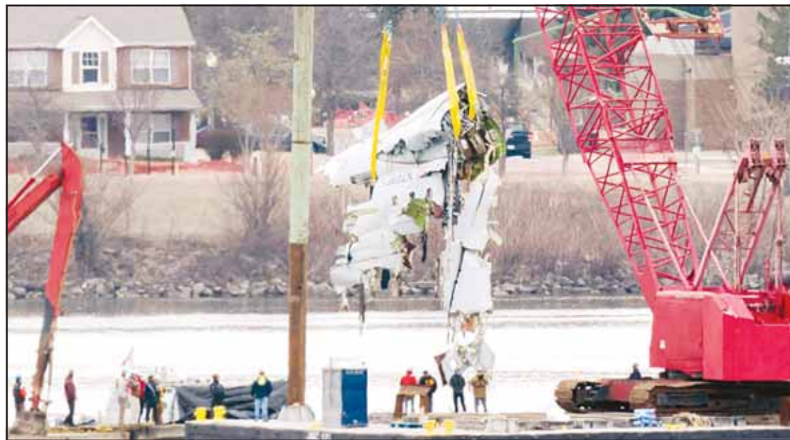
Crews pull up a part of a plane from the Potomac River near Ronald Reagan Washington National Airport on Feb 3 in Arlington, Va.

Conservative Republicans have long sought to roll back USAID's status as an independent agency, while Democrats traditionally back its status as an independent agency. President John F. Kennedy created USAID in 1961 at the height of the United States' Cold War struggle with the Soviet Union, seeking a more efficient way to counter Soviet influence abroad through foreign assistance, and viewing the State Department as frustratingly bureaucratic at that.