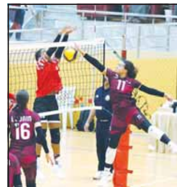
Players battling for the ball during the tournament.