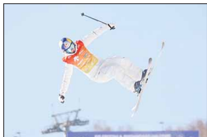
In this file photo, Gu Ailing of China competes during the women's halfpipe qualification at FIS Freeski World Cup 2025 in Zhangjiakou, north China's Hebei Province.

The ninth Asian Winter Games will take place in Harbin, northeast China's Heilongjiang province from Feb. 7 to 14. Over 1,270 athletes from 34 countries and regions across Asia will participate, making this edition the largest in terms of participating delegations and athletes.