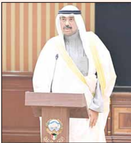
Newly-appointed Defense Minister Sheikh Abdullah Ali Abdullah Al-Salem Al-Sabah takes the constitutional oath before His Highness the Amir.