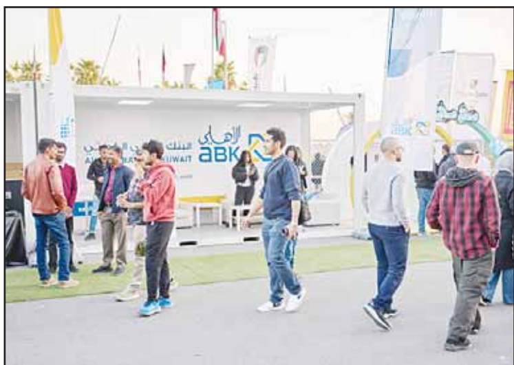
Crowd at ABK stand at event.

For more information about ABK, please follow the Bank's Instagram account @abk_kuwait, visit eahli.com, contact Ahlan Ahli 1 899 899 or visit one of the Bank's branches across Kuwait.