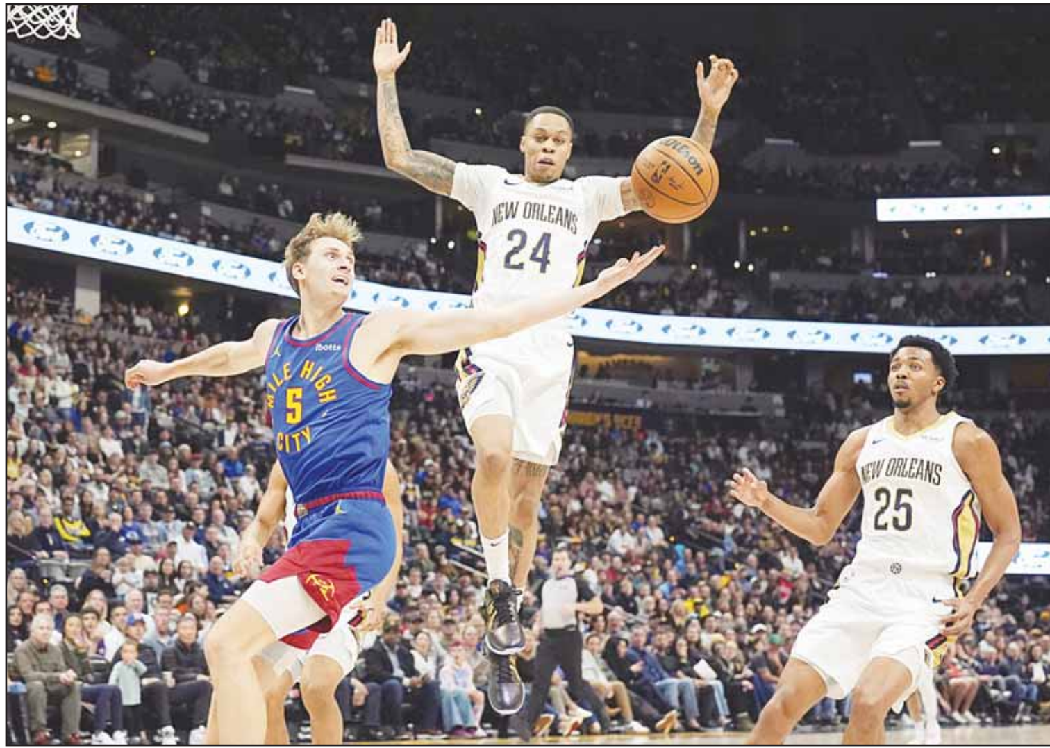
Denver Nuggets forward Hunter Tyson (5) reaches for the ball as New Orleans Pelicans guards Jordan Hawkins (24) and Trey Murphy III (25) defend in the first half of an NBA basketball game in Denver.