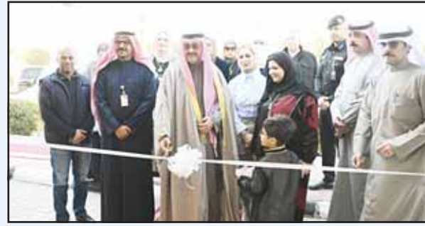
Capital Governor Sheikh Abdullah Salem Al-Ali Al-Sabah inaugurates the awareness day exhibition.