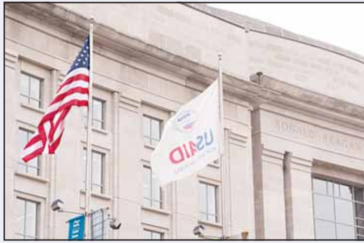
The flag of the United States Agency for International Development, or USAID, right, flies alongside the American flag in front of the USAID office in Washington on Feb 3.

Showing the extraordinary power of Musk and his budget-slashing Department of Government Efficiency, thousands of USAID employees have been laid off and programs shut down around the world in the two weeks since