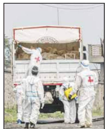
Red Cross personnel load bodies of victims of the fighting between Congolese government forces and M23 rebels in a truck in Goma, Democratic Republic of Congo on Feb 3 as the UN health agency said 900 died in the fight.

But the rebels said Monday they did not intend to seize Bukavu, though they earlier expressed ambition to