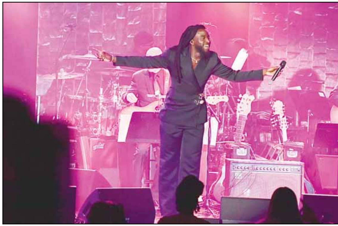
Shaboozey performs during the Pre-Grammy Gala on Saturday, Feb. 1, 2025, at the Beverly Hilton Hotel in Beverly Hills, Calif. Shaboozey will literally be in the game at the Madden Bowl.

The Madden Bowl won't be the only stage where Stapleton will showcase his powerhouse vocals. The country star is set to headline the SiriusXM and Pandora concert on Thursday night.