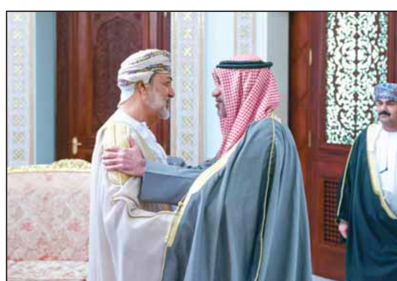
Sultan of Oman Haitham bin Tariq receives Kuwait's First Deputy Prime Minister and Interior Minister Sheikh Fahad Yousef Saud Al-Sabah.