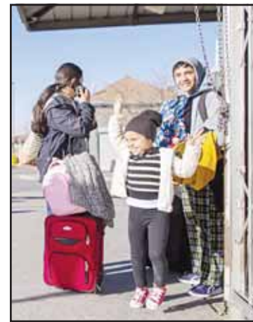
A migrant family from Michoacan, Mexico wait for transportation after entering the United States through Ciudad Juarez, Mexico through the Paso del Norte bridge, on Jan 20 in El Paso, Texas.

In an executive order, Trump declared that the situation at the southern border constitutes an invasion of America and that he was "suspending