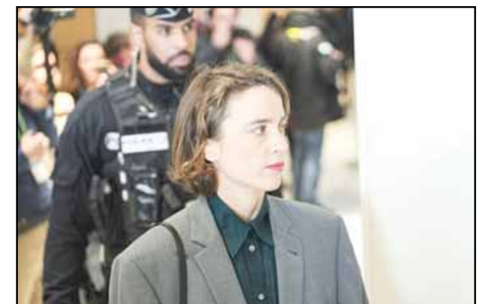
French actor Adele Haenel arrives at the courthouse in Paris, Monday, Feb. 3, 2025, for the trial of filmmaker Christophe Ruggia.