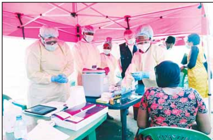
Health workers prepare to administer vaccines against the Sudan strain of Ebola, during a trial at Mulago Referral Hospital, in Kampala, Uganda, Monday, Feb. 3, 2025.

This is the first Ebola outbreak since the Trump administration's decision last week to withdraw from the U.N. health agency, and since Trump's order for a freeze on foreign assistance.