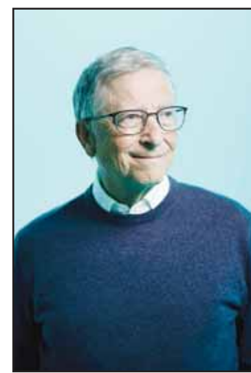
Bill Gates stands for a photo after an interview with The Associated Press in Indian Wells, Calif., Wednesday, Jan. 8, 2025.

Gate's self-portrait is that of a nerd nicknamed "Trey" by his card-playing grandmother because he was the third male on this father's side of the family