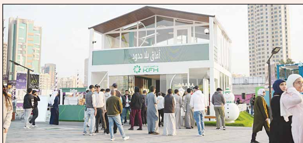
Great interaction at KFH Zone.

Hesabi account benefits Among the many benefits offered through Hesabi accounts for youth aged 15 to 25 are the following: automatic enrollment in KFH Rewards program, one of the best rewards programs in Kuwait; 24/7 banking services; exclusive offers and discounts from a wide range of merchants; a free Hesabi prepaid card; free online banking services; eligibility to open an Al-Hassad account, allowing them to win from over 400 prizes annually; and eligibility to open an Al-Rabeh account with a wide range of benefits.