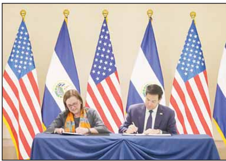
US Secretary of State Marco Rubio, (right), and El Salvador's Foreign Minister Alexandra Hill Tinoco sign a memorandum of understanding regarding civil nuclear cooperation between their countries at the Intercontinental Real Hotel in San Salvador, El Salvador on Feb 3.

Rubio arrived in San Salvador shortly after watching a US-funded deportation flight with 43 migrants leave from Panama for Colombia. That came a day after Rubio delivered a warning to Panama that unless the government