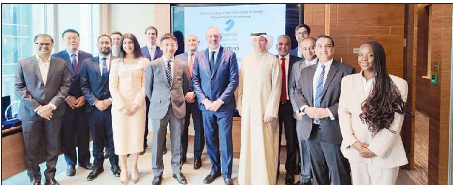
A group photo featuring members of Burgan's Executive Management with Mizuho's team at the signing ceremony.

In addition, they believe that this transformation will drive Jordan towards innovation, minimize waste, and ensure long-term environmental and economic benefits.