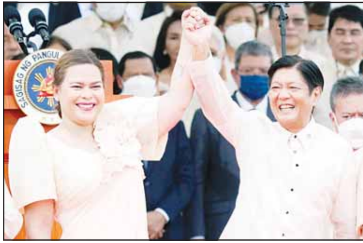
Philippine President Ferdinand Marcos Jr. (center right) and Vice President Sara Duterte, daughter of former Philippine president Rodrigo Duterte, raise hands during the inauguration ceremony at National Museum on June 30, 2022 in Manila, Philippines.

The vice president didn't immediately comment on the House decision to impeach her, but her brother, Rep. Paolo Duterte said that the move was "a clear act of political persecution." Rival lawmakers maneuvered to quickly collect signatures and push a "baseless impeachment case" to the