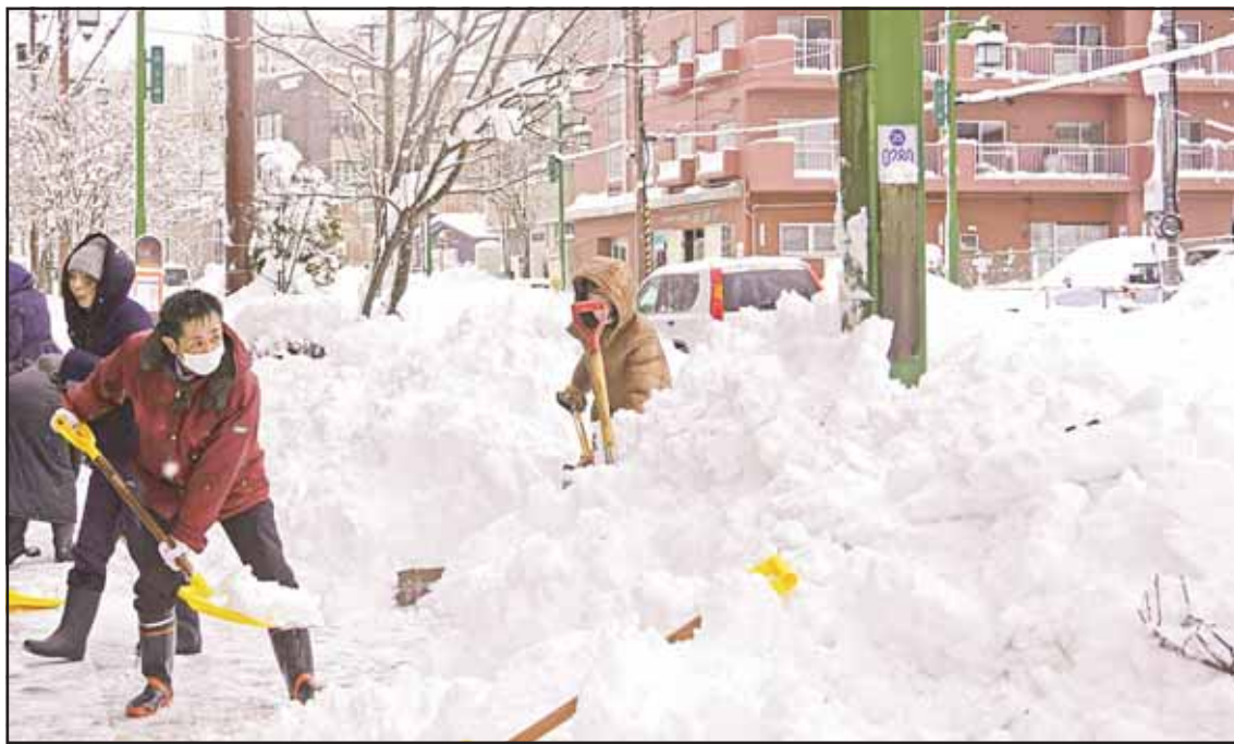
People remove snow from a street in Kushiro, Hokkaido, Japan on Feb 5.

The impeachment complaint accused Duterte of undermining the Marcos government's policies, including her description of the administration's handling of territorial disputes with Beijing in the South China Sea as a "fiasco." Duterte has repeatedly accused Marcos, his wife and Romualdez of corruption, weak leadership and attempting to muzzle her because of speculation she may seek the presidency in 2028.