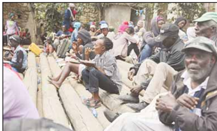
People displaced by armed gang attacks take refuge in the town hall of the Kenscoff neighborhood of Port-au-Prince, Haiti on Feb 3.

US Secretary of State Marco Rubio said earlier this week the deportation flights were an effective way to stem the flow of illegal migration, which he said is destructive and destabilizing. The US government carries out deportations through commercial and chartered flights, he added.