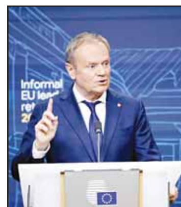
Poland's Prime Minister Donald Tusk addresses a media conference at the end of an EU summit in Brussels on Feb 3.

Poland in 2023 elected a pro-rule of law government headed by Prime Minister Donald Tusk, which has stepped