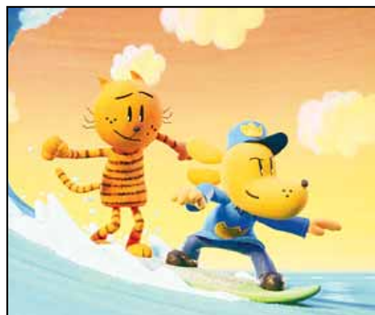
This image released by Universal Pictures shows Petey, voiced by Pete Davidson, (left), and Dog Man, voiced by Peter Hastings in a scene from DreamWorks Animation's 'Dog Man.'

Peter Hastings, director, screenwriter and animal voice of Dog Man, has had a hand in Pilkey's much better adaptation of "Captain Underpants," but this time smashes together characters and plot lines from several of the books