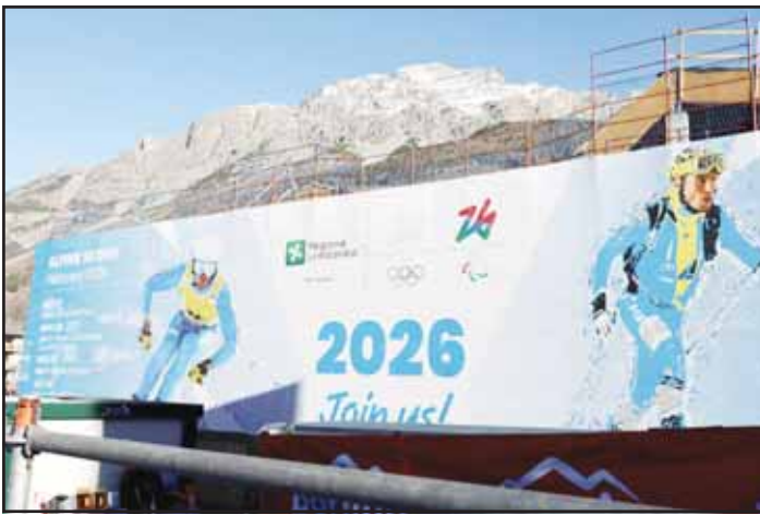
A billboard advertising the Milan Cortina 2026 Winter Olympics is seen at one of the venues for the alpine ski discipline, in Bormio, Italy.

With 180 people working from 6 a.m. to 1 a.m. every day to build the