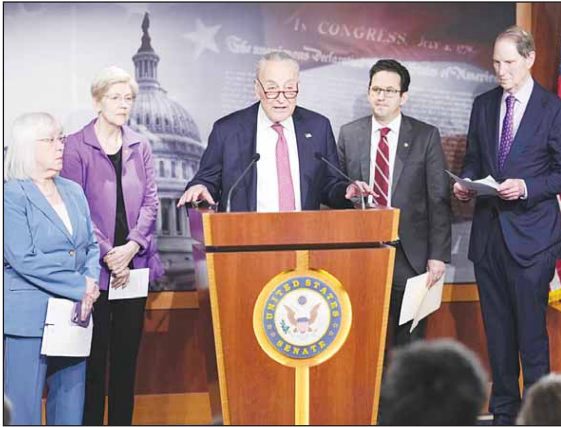
US Senate Minority Leader Chuck Schumer, D-NY, (center), is joined from left by Sen Patty Murray, D-Wash, Sen Elizabeth Warren, D-Mass, Sen Brian Schatz, D-Hawaii and Sen Ron Wyden, D-Ore, ranking member of the Senate Finance Committee, as they speak about the Department of Government Efficiency, or DOGE, during a news conference at the Capitol in Washington on Feb 3.