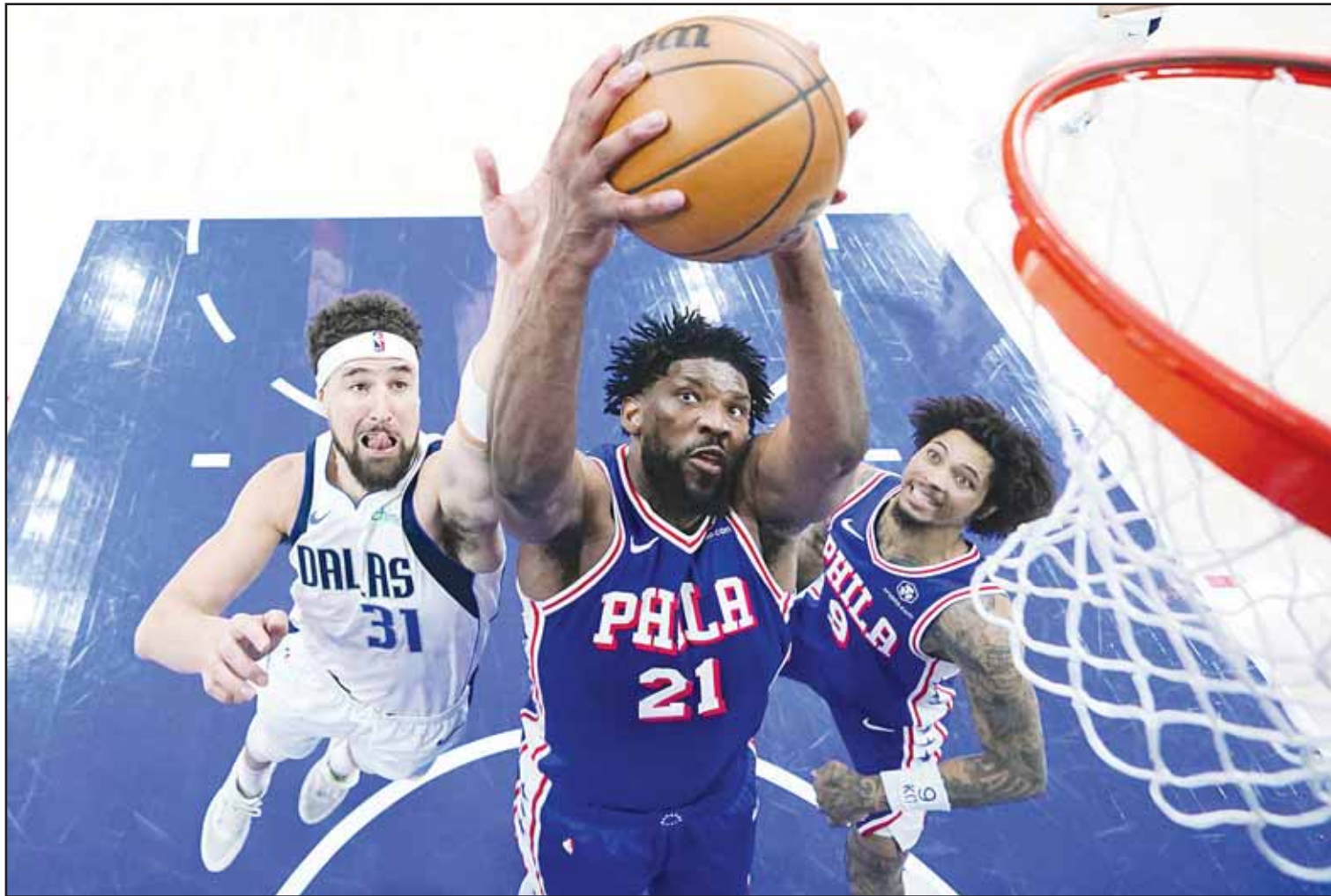
Philadelphia 76ers' Joel Embiid, center, pulls in a rebound between Dallas Mavericks' Klay Thompson, left, and Kelly Oubre Jr. during the second half of an NBA basketball game in Philadelphia.

Embiid's triple-double leads 76ers to victory over Mavericks