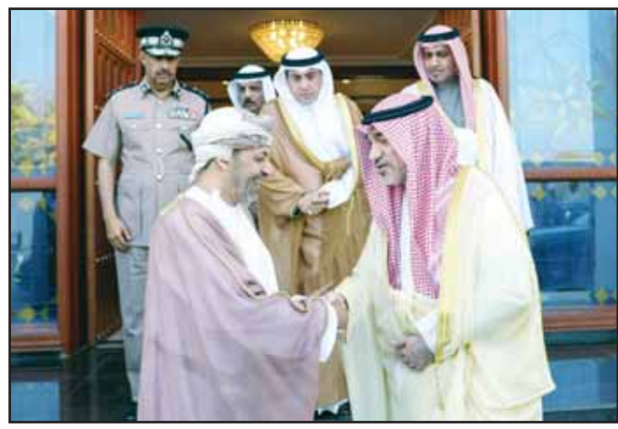
Kuwait's Deputy Prime Minister and Interior Minister Sheikh Fahad Yousef Al-Sabah held talks with his Omani counterpart Hamoud Al Busaidi over efforts to bolster security cooperation.

It is worth noting that the festival is being held at the Mubarakia Market, with the participation of 16 leading Kuwaiti companies from various local industries, in addition to Kuwait Oil Company and Kuwait Airways, which are presenting special offers to visitors.