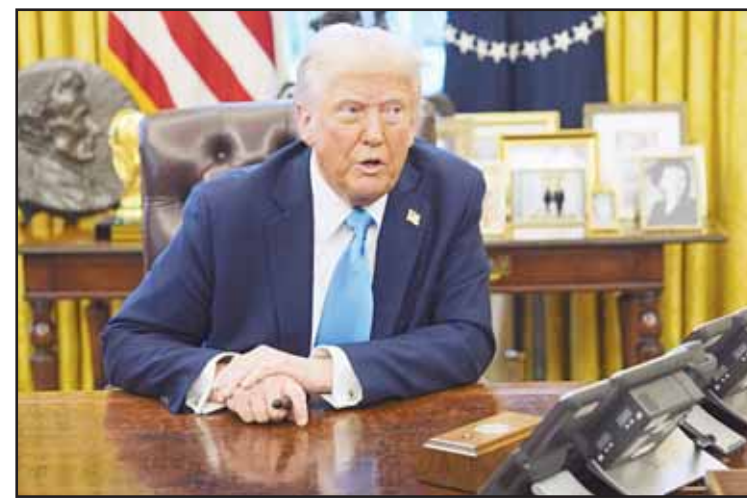
US President Donald Trump speaks to reporters as he signs executive orders in the Oval Office of the White House on Feb 5 in Washington.

The United States, with the world's largest economy, pays 22% of the UN's regular operating budget, with