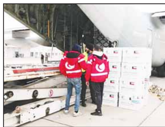
Syrian Red Crescent members transfer Kuwaiti aid to their trucks.

The total aid provided to Syria via the Kuwaiti air bridge