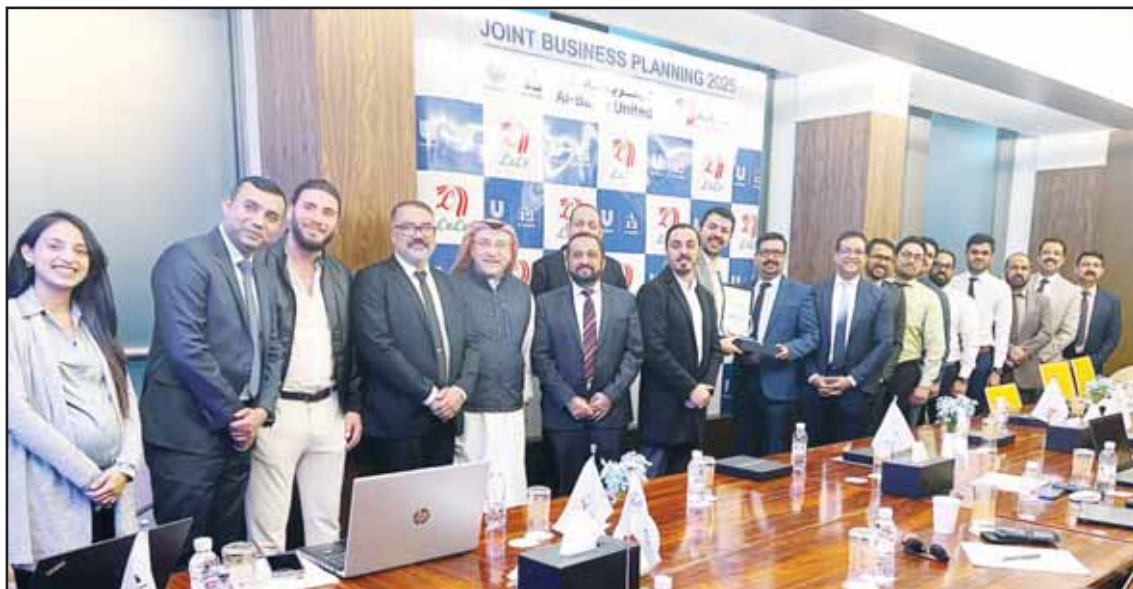
Strategic collaboration with Unilever and Al Bahar to shape LuLu's 2025 Vision.