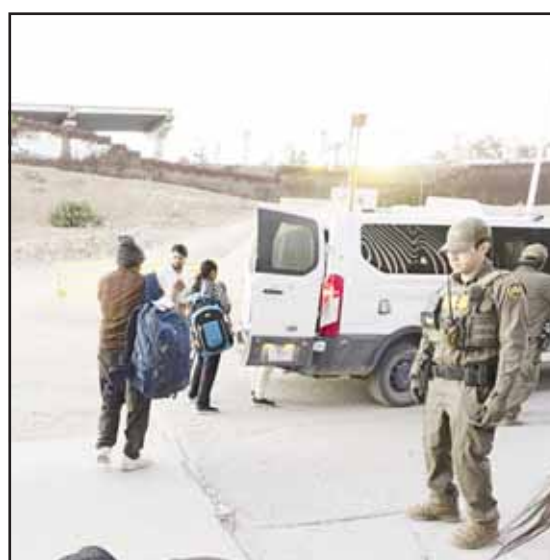
Migrants make their way to a Border Patrol van after crossing illegally and waiting to apply for asylum between two border walls separating Mexico and the United States, Tuesday, Jan. 21, 2025, in San Diego.

As part of the agreement, Trump announced a one-month suspension of a planned 25-percent tariff on Mexican imports.