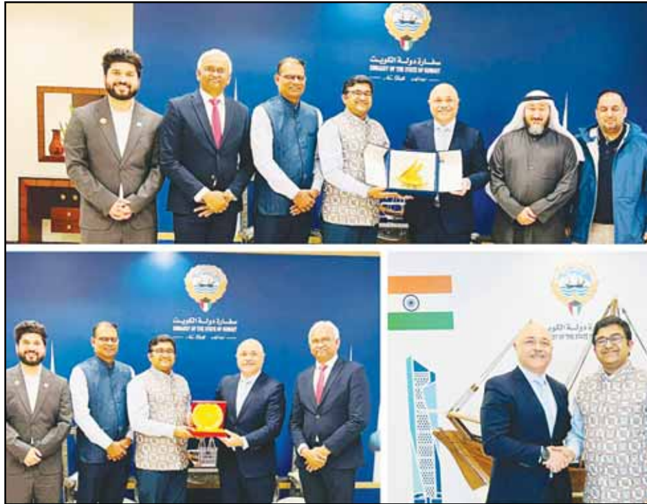
A combo photo from the ICAI Kuwait Chapter, KAAA delegation's meeting with Kuwait's Ambassador to India in New Delhi.

The ICAI Kuwait Chapter and KAAA reaffirmed their commitment to fostering stronger partnerships, organizing joint initiatives, and contributing to the advancement of financial and auditing standards in the region. The meeting concluded on a positive note, with both sides looking forward to enhanced cooperation and knowledge sharing in the future.