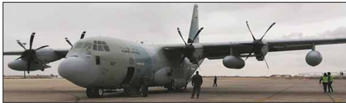
The 19th plane from the Kuwaiti air bridge arrives at Damascus International Airport.

Amid his official state visit to the Gulf Arab Sultanate, the Kuwaiti interior minister held similar talks with Muscat's Deputy Prime Minister for Defense Affairs Shihab bin Tarik Al Said, which also focused on efforts to propel security relations to greater levels, added the statement.