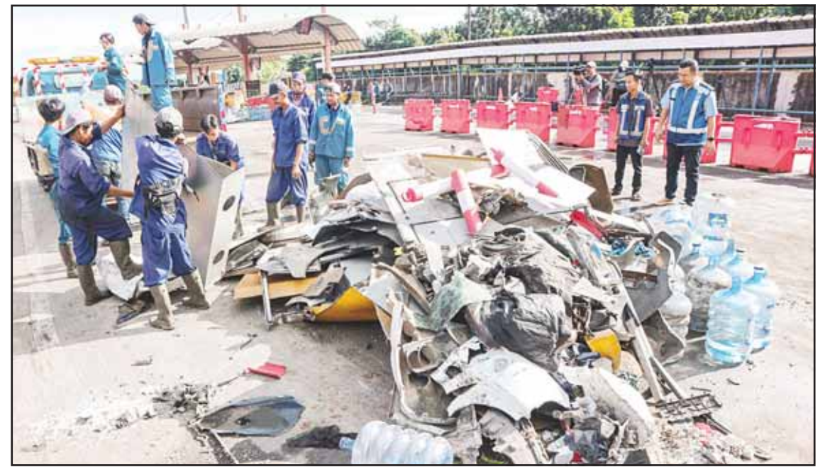
People collect the wreckage at the site of a traffic accident near the Ciawi Toll Gate in Bogor Regency, Indonesia on Feb 5. (Xinhua)

The prefecture said parts of highways and main roads were closed, and train services in the affected areas were suspended. Runways were closed due to snow at Obihiro and Kushiro airports, while dozens of flights in and out of Hokkaido were cancelled, affecting thousands of people. About 370 schools canceled classes Tuesday across Hokkaido, according to the prefecture. (AP)