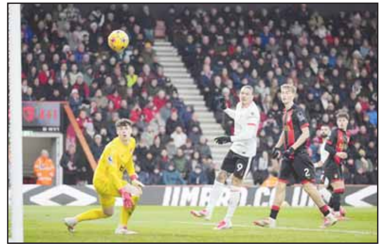
Liverpool's Mohamed Salah, background right, scores his side's second goal during the English Premier League soccer match between Bournemouth and Liverpool at the Vitality stadium in Bournemouth, England.

"I think the one we were more interested in was why he didn't give the second yellow card and that is something he didn't have to explain," Slot said.