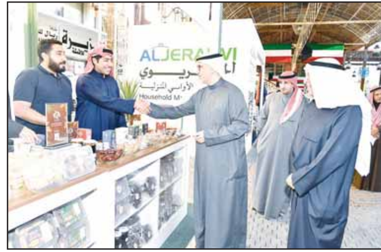
Minister of Commerce and Industry and Undersecretary of the Ministry of Commerce and Industry during their tour of the opening of the Second National Industries Pride Festival in Mubarakia Market.

He praised the efforts of all the parties organizing the festival, which is held in cooperation between the