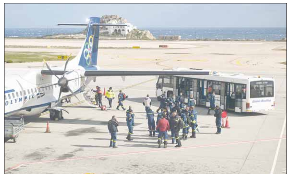
Fire service rescuers arrive at the airport of the earthquake-hit island of Santorini, Greece, on Feb 5.

The shooting started Tuesday afternoon after many students had gone home following a national exam. Students sheltered in nearby buildings, and other parts of the school were evacuated following the shooting.