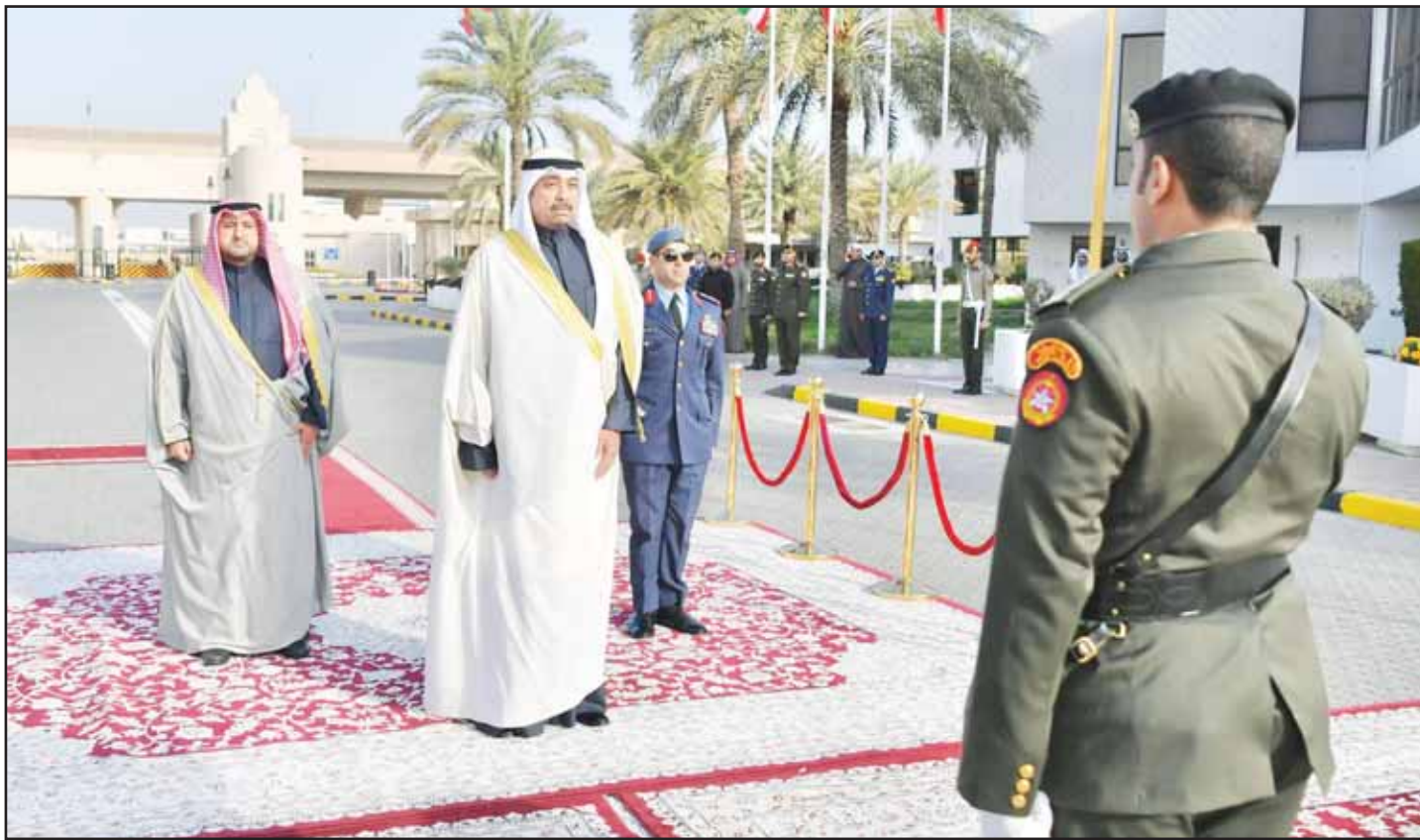
The Minister of Defense during his meeting with senior army commanders at the ministry's headquarters on the occasion of his appointment as Minister of Defense.