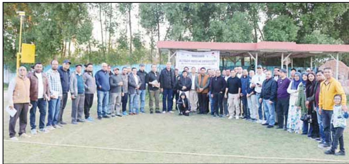
Some photos from the event.

To learn more about the Alfouz account and its range of exciting draws and prizes, please follow ABK's Instagram account @abk_kuwait, visit eahli.com, contact Ahlan Ahli 1 899 899 or visit one of the Bank's branches across Kuwait.