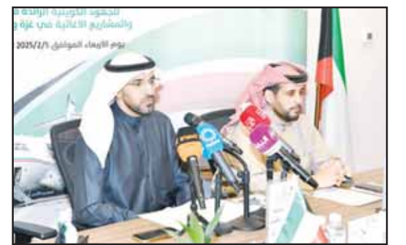
Press conference to announce the relief and humanitarian efforts made by the State of Kuwait.