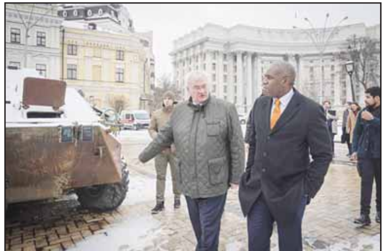
Britain's Foreign Secretary David Lammy looks at damage on a Russian APC as he speaks with Ukraine's Foreign Minister Andriy Sybiha, in central Kyiv, Ukraine on Feb 5.

Russia has repeatedly tried to cripple Ukraine's power grid, denying the country heat, electricity and running water in an effort to break the Ukrainian spirit. The attacks have also sought to disrupt Ukraine's defense manufacturing industry.