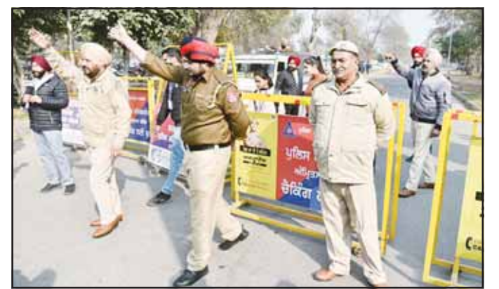
Police personnel redirect traffic near the international airport, before the arrival of a US military plane carrying deported Indian migrants, in Amritsar, India on Feb 5.