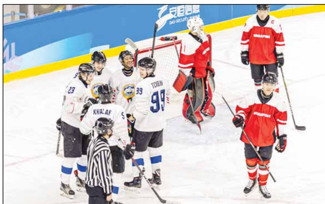
The Kuwait ice hockey team celebrates at the end of its match in China.