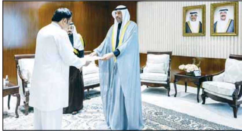
Kuwaiti Foreign Minister Abdullah Al-Yahya receives credentials of the new Sri Lankan Ambassador to Kuwait Lakshitha Ratnayake.

His Highness the Prime Minister Sheikh Ahmad Abdullah Al-Ahmad Al-Sabah then sent a cable to Governor-General of New Zealand Cindy Kiro, on the occasion of her country's National Day.