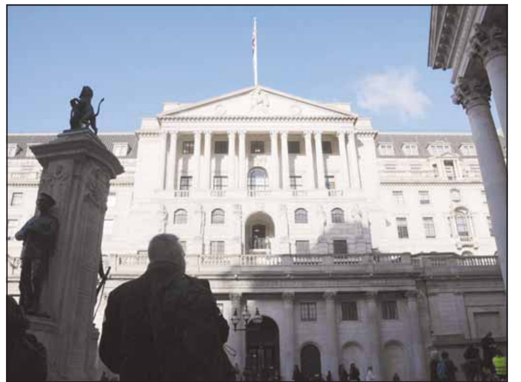
A man is silhouetted in front of the Bank of England in London, Thursday, Feb. 6, 2025 which is widely expected to cut interest rates for the third time in six months later Thursday.

Treasury chief Rachel Reeves welcomed the cut but said she was "still not satisfied with the growth rate" and that the new Labour govern-