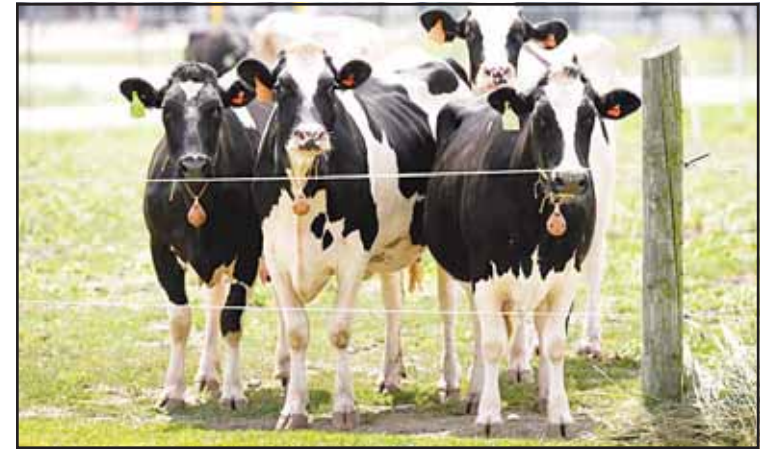
Dairy cows stand in a field outside of a milking barn at the US Department of Agriculture's National Animal Disease Center research facility in Ames, Iowa, on Tuesday, Aug. 6, 2024.

The D1.1 version of the virus was the type linked to the first US death tied to bird flu and a severe illness in Canada. A person in Louisiana died in January after developing severe respiratory symptoms following contact with wild and backyard birds. In British Columbia, a teen girl was hospitalized for months with a virus traced to