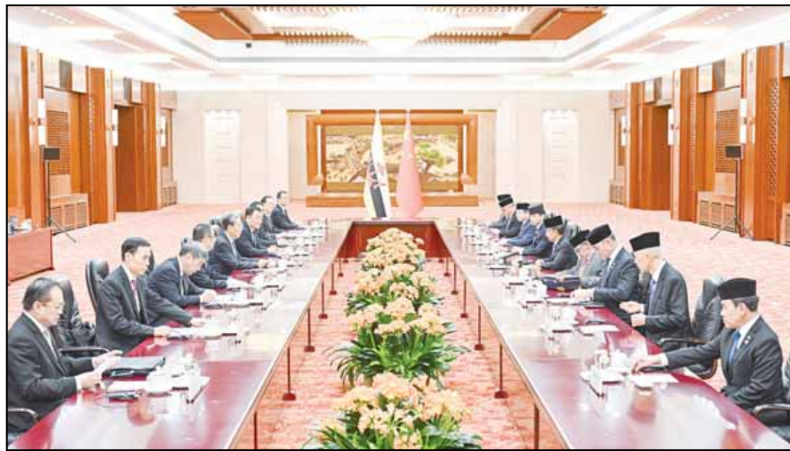
Zhao Leji, chairman of the National People's Congress (NPC) Standing Committee, meets with Sultan of Brunei Haji Hassanali Bolkiyah Mu'izzaddin Waddaulah in Beijing, capital of China on Feb 6.