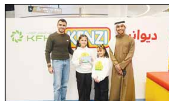
Best design winners

makes it easy to manage and track their accounts.