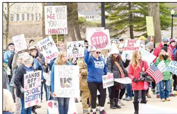
Protestors hold signs while listening to speakers during a 50501 Protest on the south steps of the West Virginia State Capitol in Charleston, W.Va on Feb 5 during what was billed as a nationwide series of protests against President Donald Trump, Project 2025, DEI rollbacks and other recent administration initiatives.

Members of Congress have expressed concern that DOGE's involvement with the US government payment system could lead to security risks or missed payments for programs such as Social Security and Medicare. A Treasury Department official says