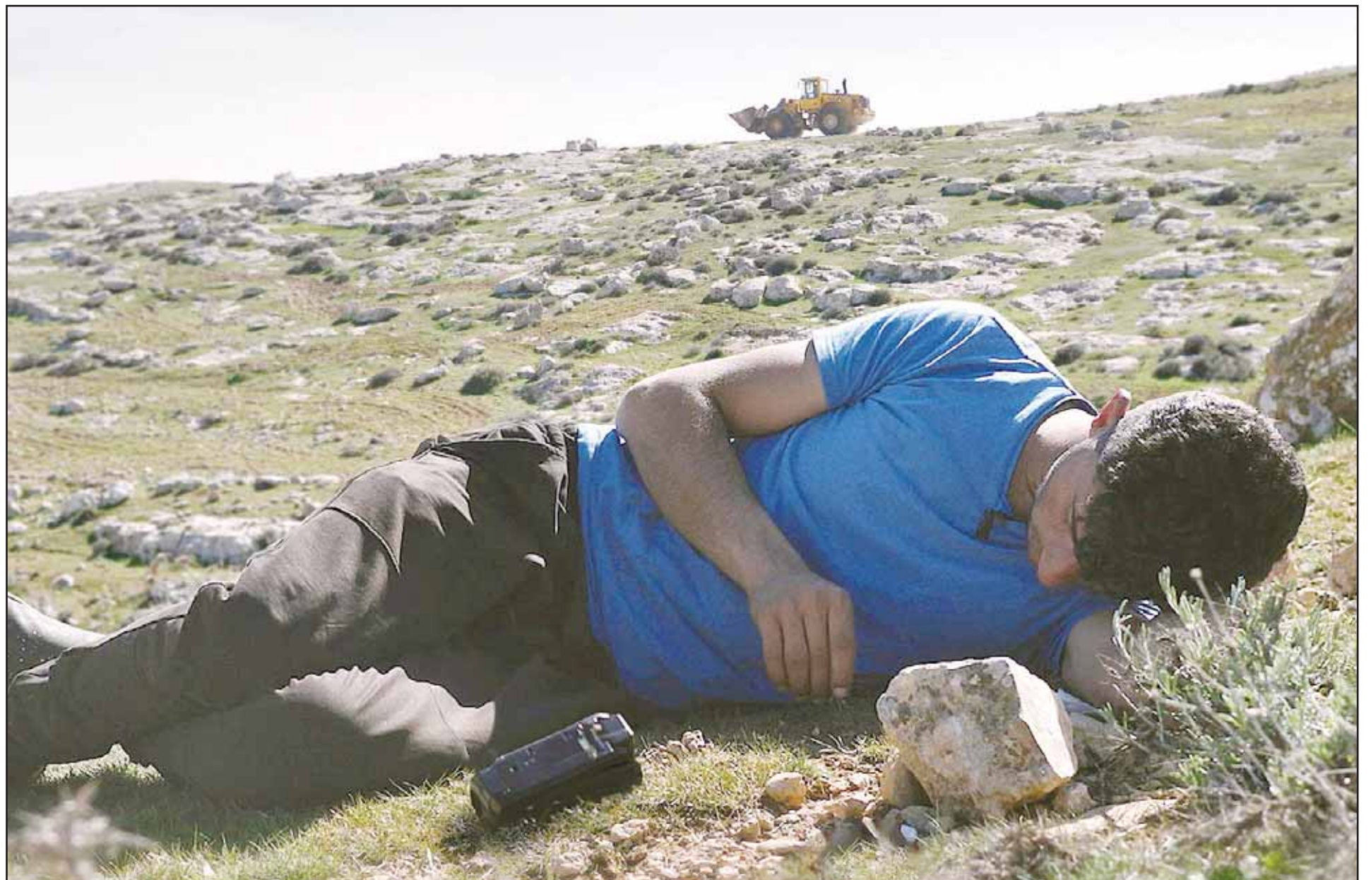
This image released by Antipode Films shows a scene from 'No Other Land'.