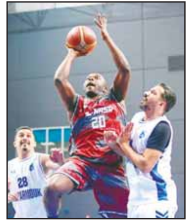
Al-Nasr player is fouled as he goes for a basket.

The postponed clash between Kuwait Club and Al-Qadisiya will determine the top two seeds in the