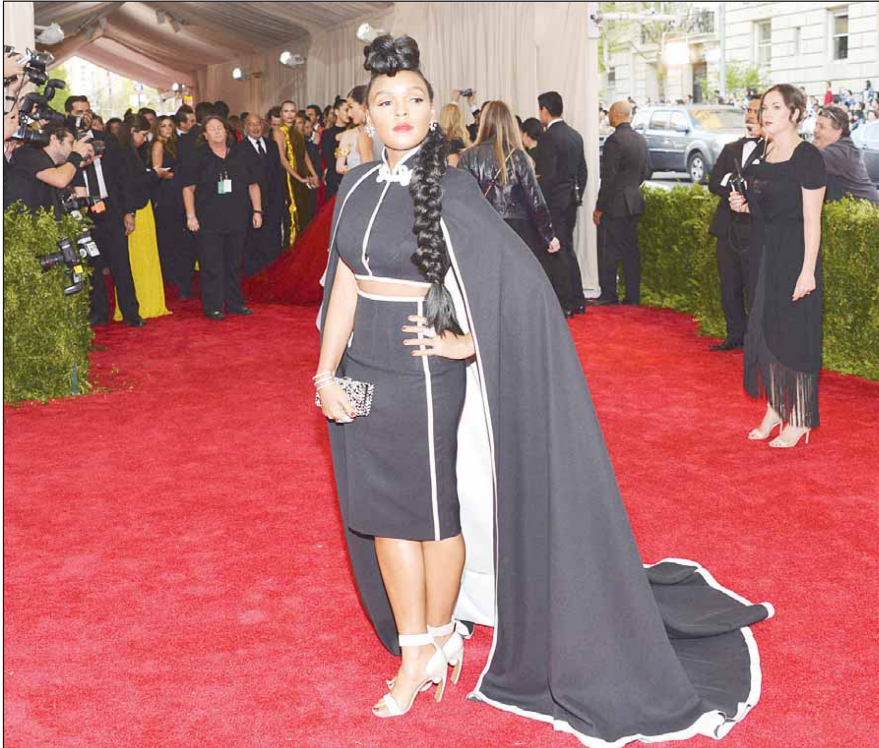
Janelle Monáe arrives at The Metropolitan Museum of Art's Costume Institute benefit gala celebrating 'China: Through the Looking Glass' on May 4, 2015, in New York.

'Tailored for You' to focus on Black style