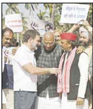
India's opposition lawmakers, some of them wearing shackles, stage a protest outside the Parliament in New Delhi, to condemn the reported mistreatment of Indian immigrants during their deportation from the United States on Feb 6. The banners in Hindi language read 'Indians in shackles, will not tolerate the insult.'

Parliament speaker Om Birla tried to calm the lawmakers, saying the trans-