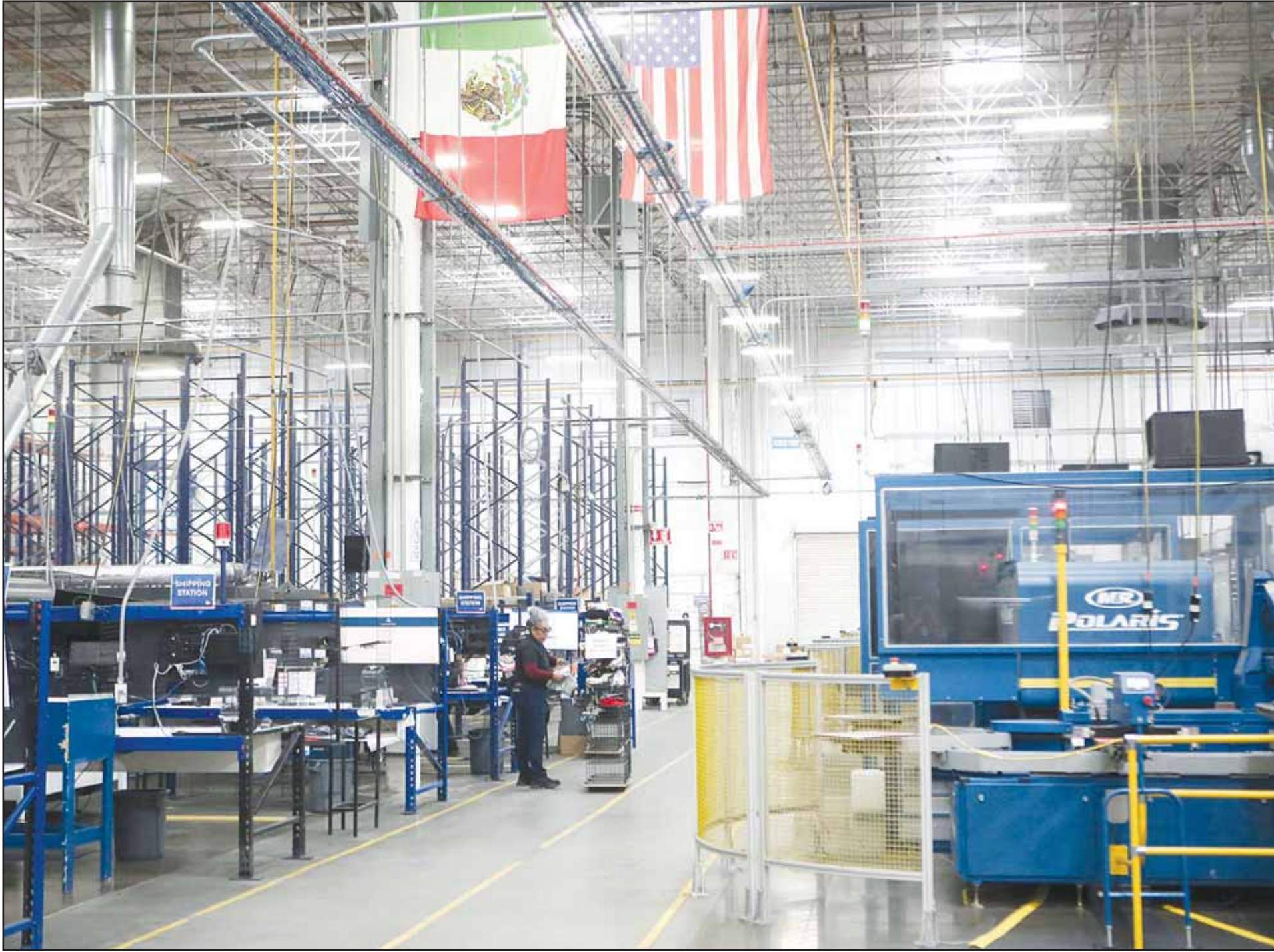
National flags representing the United States and Mexico hang inside a textile factory that produces T-shirts, in Ciudad Juarez, Mexico, Tuesday, Feb. 4, 2025.