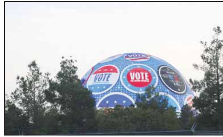
The Sphere concert venue glows after sunset displaying a digital sign to vote on Nov 5, 2024, in Las Vegas, Nev.

Now, the latest Nevada report shows, each party accounts for just under 30% of the state's registered