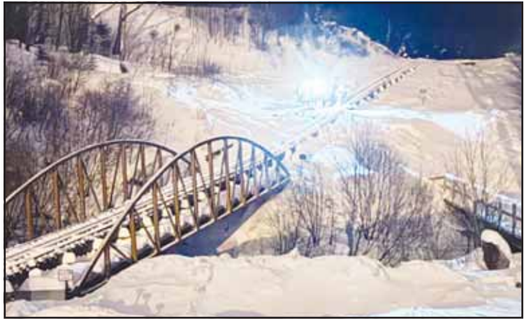
This image provided by the New Hampshire Fish and Game Department shows rescue hikers along the cog railway during a rescue mission, on Mount Washington, NH on Feb 2. (AP)