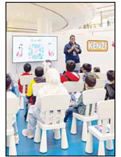
Honoring winners of the best project.