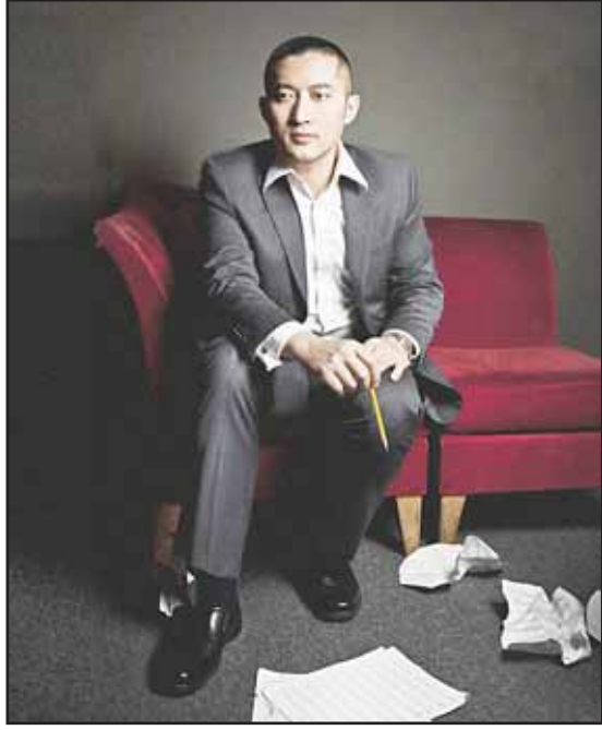
This image released by the San Francisco Opera shows composer Huang Ruo, whose 'The Monkey King,' will premiere at the San Francisco Opera on Nov. 14.