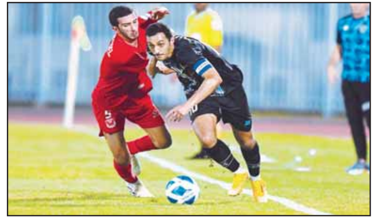
Players battling for the ball during Zain Premier League game.

Al-Salmiya and Al-Fahaheel, who played out a thrilling 2-2 draw in their first meeting, are determined to avoid slipping into the relegation zone and solidify their place in the championship race.