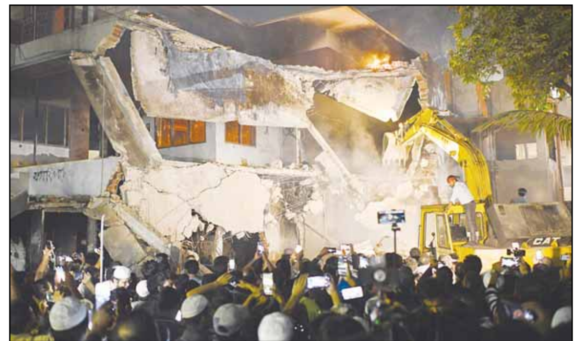
Protesters use heavy machinery to demolish the residence of Sheikh Mujibur Rahman, Bangladesh's former leader and the father of the country's ousted Prime Minister Sheikh Hasina, at Dhanmondi in Dhaka, Bangladesh on Feb 6.

On other bilateral issues, Xi said China was willing to work on a new railway project between the countries. On Tuesday, Thailand approved a $10 billion railway project that will eventually connect Bangkok to the Laos-China high speed railway.