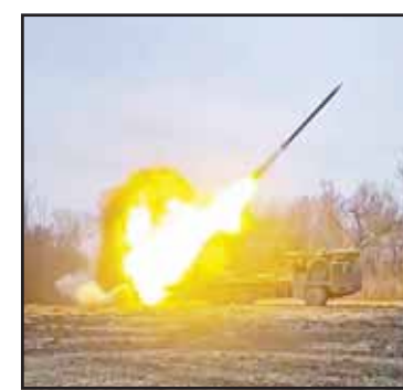
In this photo taken from a video distributed by Russian Defense Ministry Press Service on Feb 6, a Russian self-propelled multiple rocket launcher Uragan (Hurricane) is fired toward Ukrainian position at an undisclosed location in the Kursk region border area.

Ukraine has developed its own long-range drones as part of its effort to grow its domestic arms industry and become less dependent on Western help to fight its almost three-year war with Russia. The drones have at times reached deep into Russia, hitting oil refineries, weapons stores and airfields.