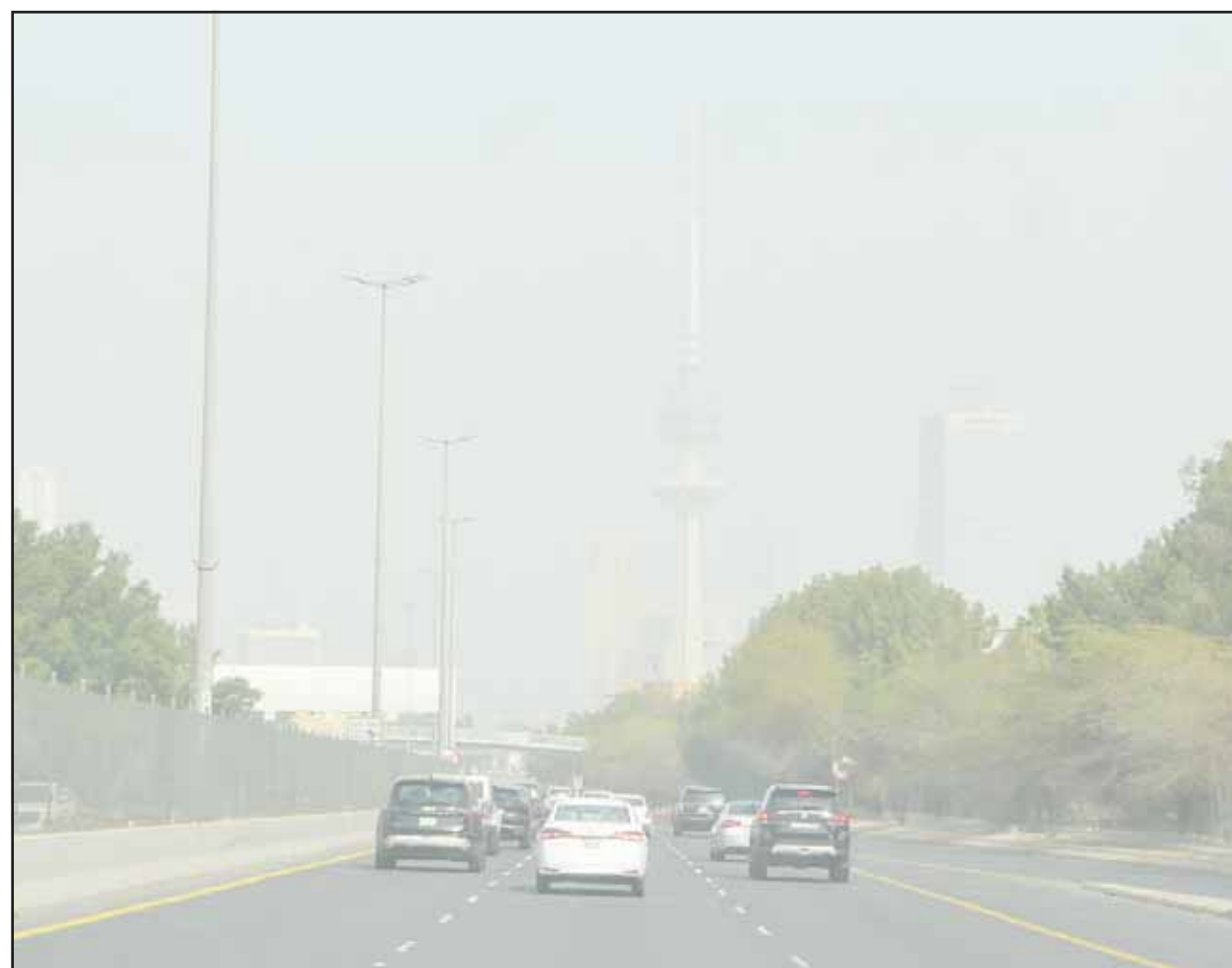
Vehicles make their way to Kuwait City through Thursday morning's haze, as strong winds stir up dust and reduce visibility.