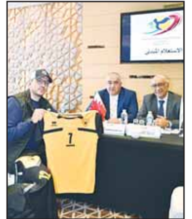
The organizing committee conducts the redraw.

The tournament follows a single-round league format, with Al-Qadisiya having prepared for the event