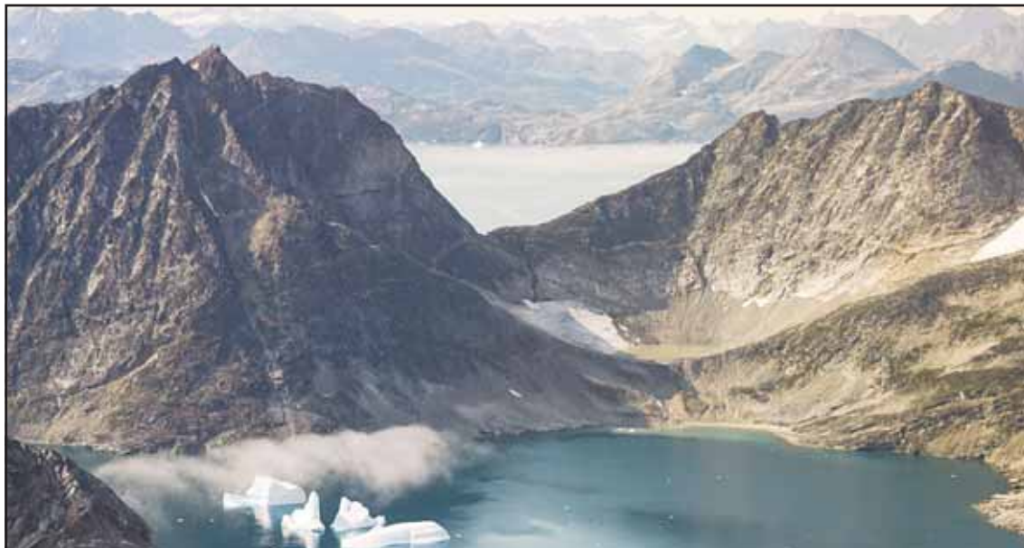
Icebergs are photographed from the window of an airplane carrying NASA scientists as they fly on a mission to track melting ice in eastern Greenland on Aug 14, 2019.

The memo satisfies the longstanding contention of Trump and his allies that the Justice Department under the Biden administration had become "weaponized" against conservatives, even though some of its most high-profile probes concerned the Democratic president and his son, and there's been no evidence to support the idea that the prosecutions against Trump were launched for a partisan purpose.