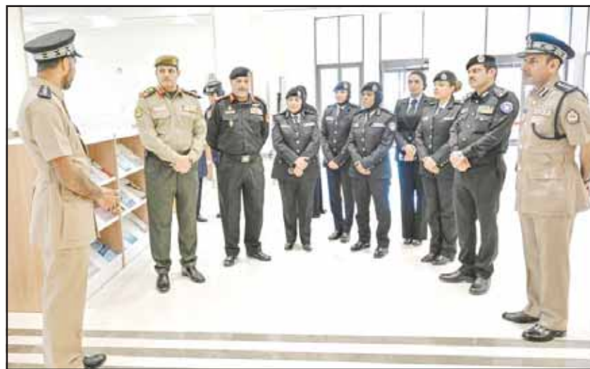
A Kuwaiti military delegation visits the Sultan Qaboos Academy for Police Sciences to enhance cooperation in the fields of education and training for women.

A case was registered and investigations are ongoing.