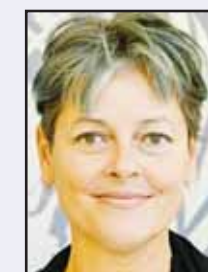
Van de Perre

"It was during the operation that a group of criminals ambushed the detachment of the internal security forces which resulted in the loss of 10 of our soldiers," it said. It did not specify who the criminals were. (AP)