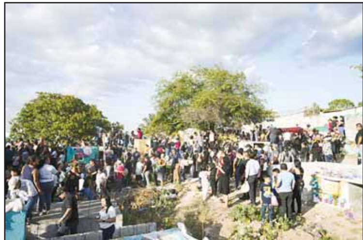
Mourners attend the burial ceremony for victims of a bus crash at the cemetery in Santo Domingo Los Ocotes, Guatemala on Feb 11.

One teen was raped by six men, and her sister by five others.