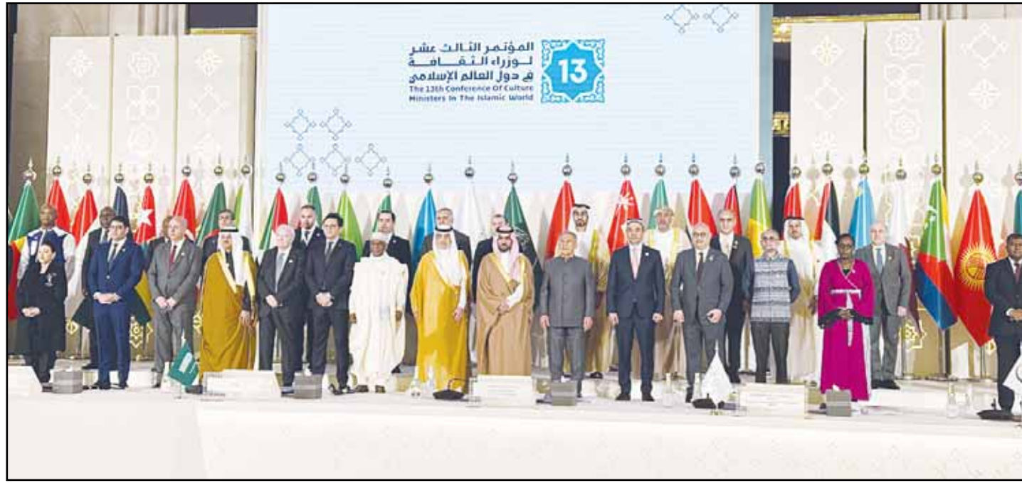
A group photo at the opening of the 13th Conference of Ministers of Culture in the Islamic World in Jeddah.

JEDDAH, Feb 12, (KUNA): The 13th Conference of Ministers of Culture in the Islamic World kicked off on Wednesday, in Jeddah, held by the Islamic World Educational, Scientific and Cultural Organization (ICESCO) in cooperation with the Saudi Ministry of Culture and with the participation of Kuwait.