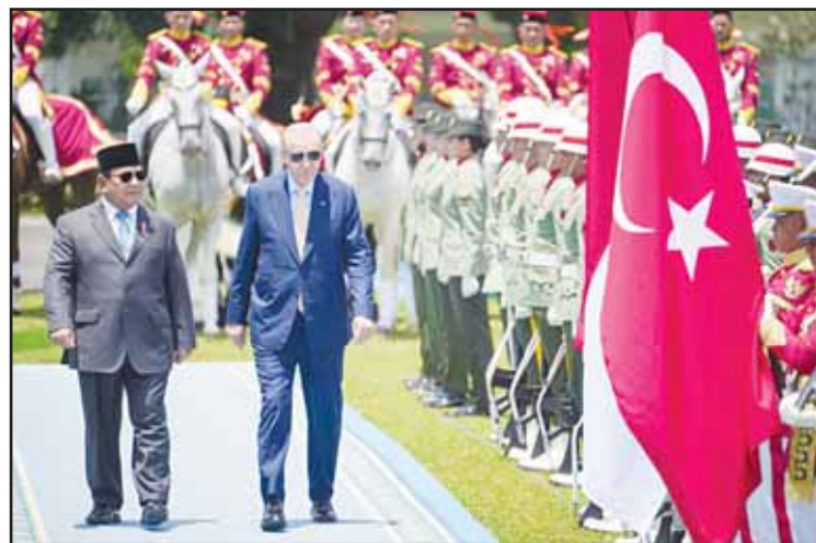
Indonesian President Prabowo Subianto, left, walks with Turkey's President Recep Tayyip Erdogan as they inspect honor guard during a welcoming ceremony prior to their meeting at Bogor Presidential Palace in Bogor, West Java, Indonesia on Feb 12.

The two countries signed a defense cooperation agreement in 2010, under which Indonesia's state-run arms producer Pindad and Turkey's FNSS jointly developed a new model of medium tank. In 2023, the two countries inked a plan of action for joint military exercises and defense industry cooperation.