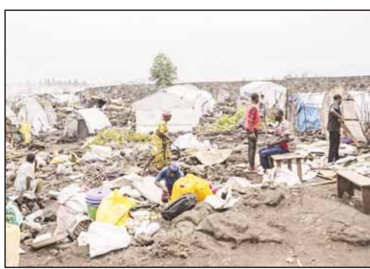
People who were displaced by the fighting between M23 rebels and government soldiers prepare to leave their camp following an instruction by M23 rebels in Goma, Democratic Republic of the Congo on Feb 11.

The M23 rebels - the most prominent of more than 100 armed groups vying for control of Congo's mineral-rich east - captured Goma, the region's largest city in late January in a major escalation of the yearslong fighting with government forces. The rebels' advance into Goma has killed at least 2,000 people in and around the city, Congolese authorities have said.