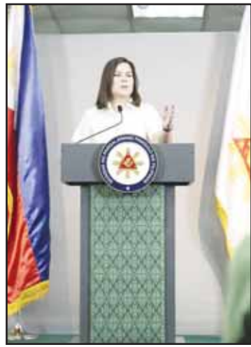
Philippine Vice President Sara Duterte gestures as she speaks during a press conference in Manila, Philippines on Feb 7.

The vice president's father himself, whose presidential term ended in 2022, is facing legal troubles. The International Criminal Court has been investigating the widespread killings under a brutal anti-drug crackdown he oversaw while in office as a possible crime against humanity. Sara Duterte ran as Marcos' vice presidential running mate in 2022. Their whirlwind political