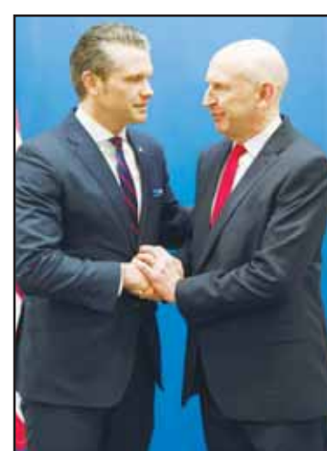
United States Secretary of Defense Pete Hegseth, (left), shakes hands with Britain's Defense Secretary John Healey prior to a bilateral meeting on the sidelines of a NATO defense ministers meeting at NATO headquarters in Brussels on Feb 12.

No decision has been made on who might chair the next meeting, if one is