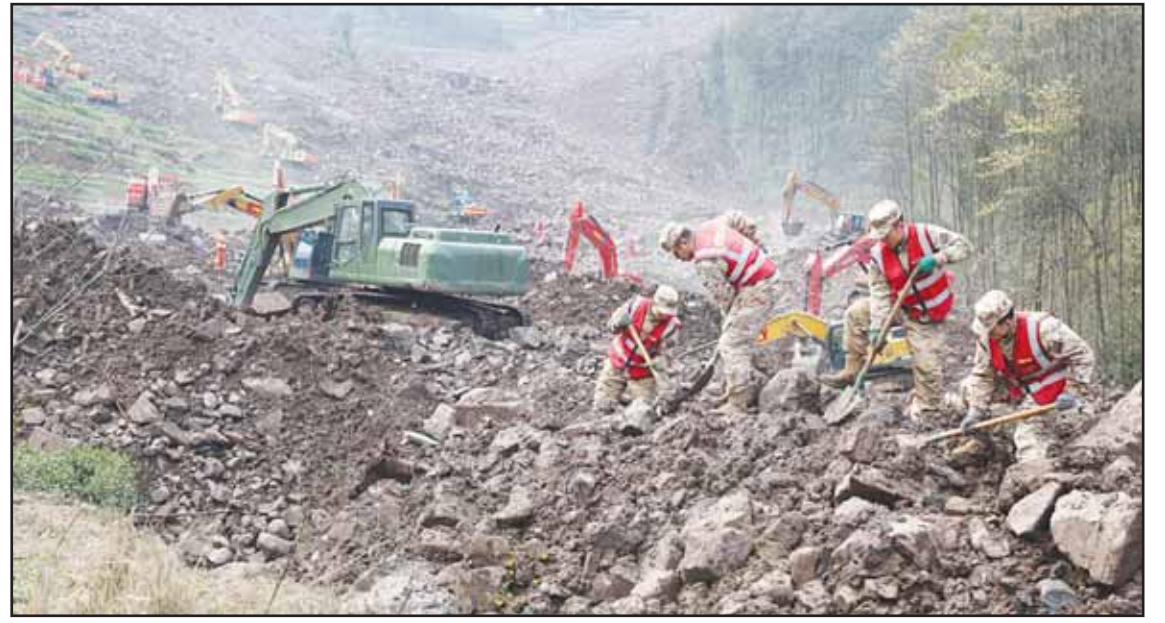
Rescuers work at the rescue site in Junlian County in the city of Yibin, southwest China's Sichuan Province on Feb 10.

Meanwhile, an alliance of women in the Philippines, GABRIELA, on Wednesday condemned what it described as covert operations of the United States military in the Southeast Asian country.