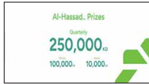
KFH's Al-Hassad draw

Al-Hassad offers weekly, monthly, and quarterly draws, a total of more than 400 prizes. The draws offer KD 1000 weekly, for 10 winners, KD 100,000 monthly and KD 250,000 quarterly in addition to prizes between 100 to 250 thousand Kuwaiti Dinars worth of value, as well as the year-end profits distribution. The account meets the aspirations of a wide segment of customers who wish to