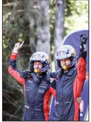
Sébastien Ogier, alongside co-driver Vincent Landais.

Over the years, Toyota has been participating in many different forms