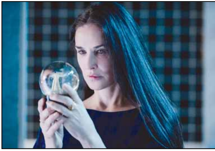
This image released by Mubi shows Demi Moore in a scene from 'The Substance.'

The USC Annenberg Inclusion Initiative, which also released its annual study Tuesday, found that 54% of the top 100 films at the box office in 2024 featured girls and women as protagonists. That's a massive jump from just the year prior, when 30% of films featured women in lead