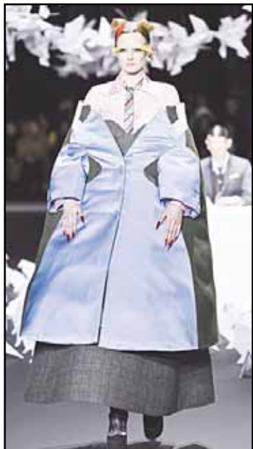
Models walk the runway during the Thom Browne Fall/Winter 2025 fashion show as part of New York Fashion Week on Tuesday, Feb. 11, at The Shed in New York.