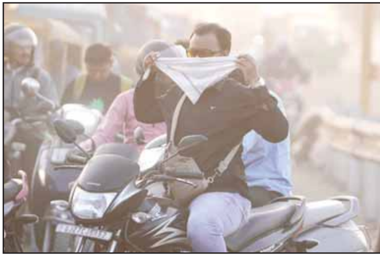
A man covers his face to protect from the dust as he waits at a crossroad in Ahmedabad, India, Wednesday, Feb. 5, 2025.

"Blue skies can't guarantee you clean air," she said.