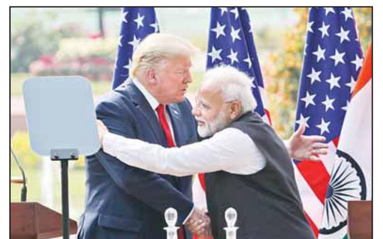
US President Donald Trump and Indian Prime Minister Narendra Modi embrace after giving a joint statement in New Delhi, India on Feb 25, 2020.