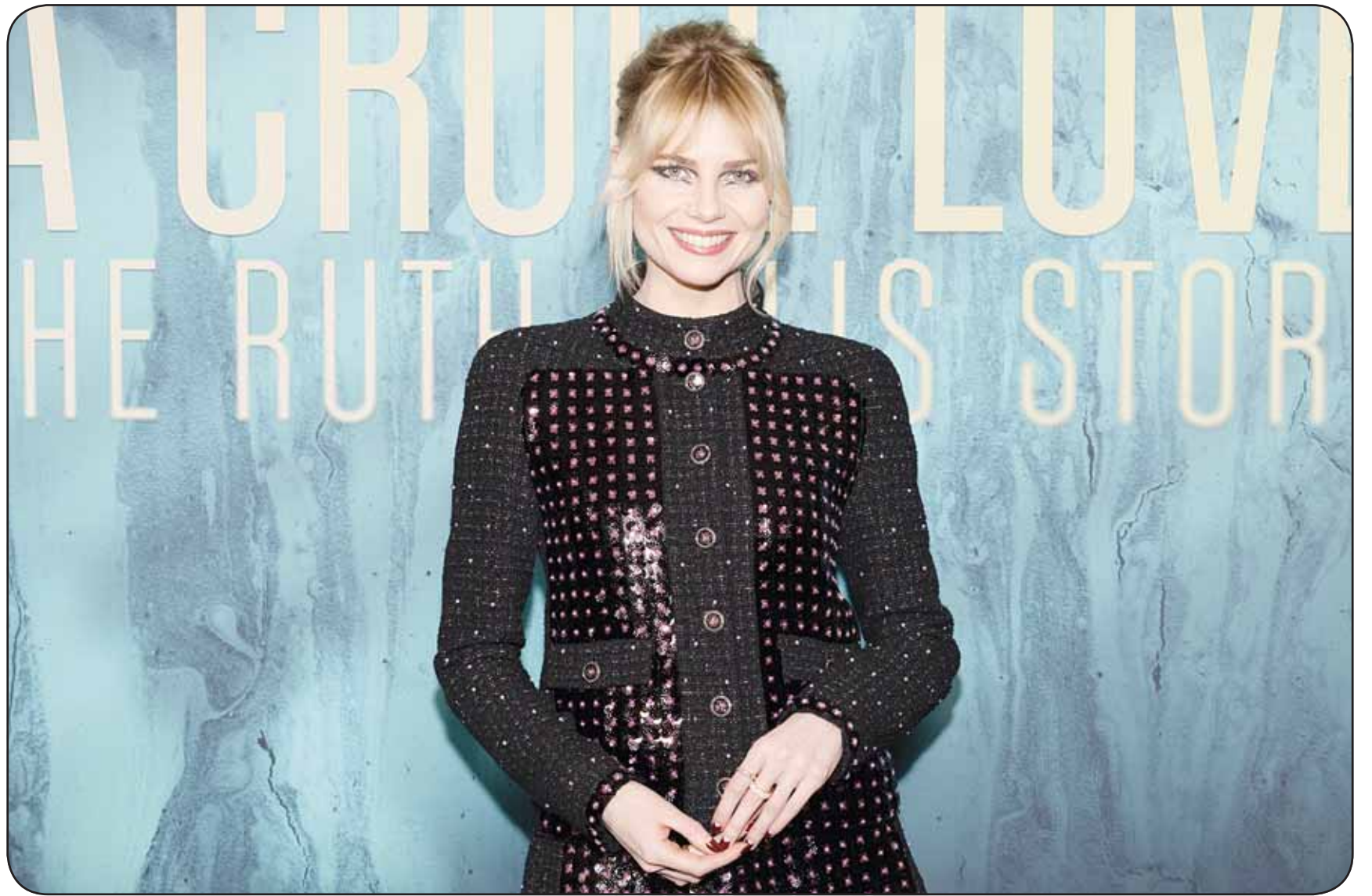
Lucy Boynton attends the premiere of 'A Cruel Love: The Ruth Ellis Story' at the Crosby Street Hotel on Tuesday, Feb. 11, in New York.