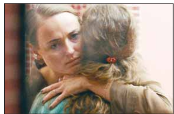
This image released by IFC Films shows Renate Reinsve in a scene from 'Armand.'