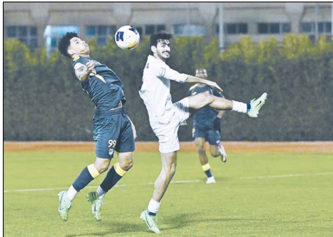
Players in an aerial battle during the Zain First Division League match.

has played one game fewer. Al-Sahel remains in third place with seven points, level with Burgan in fourth. Al-Sulaibikhat, meanwhile, dropped to the bottom of the table with five points following its latest defeat.