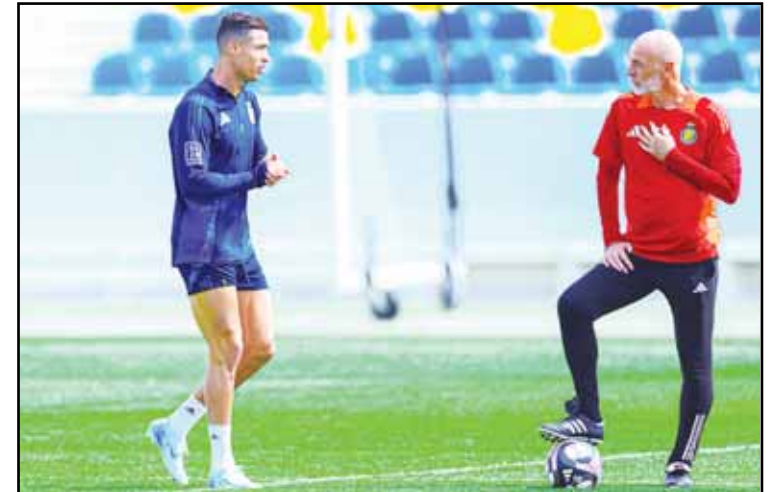
Ronaldo preparing for the Saudi classico.