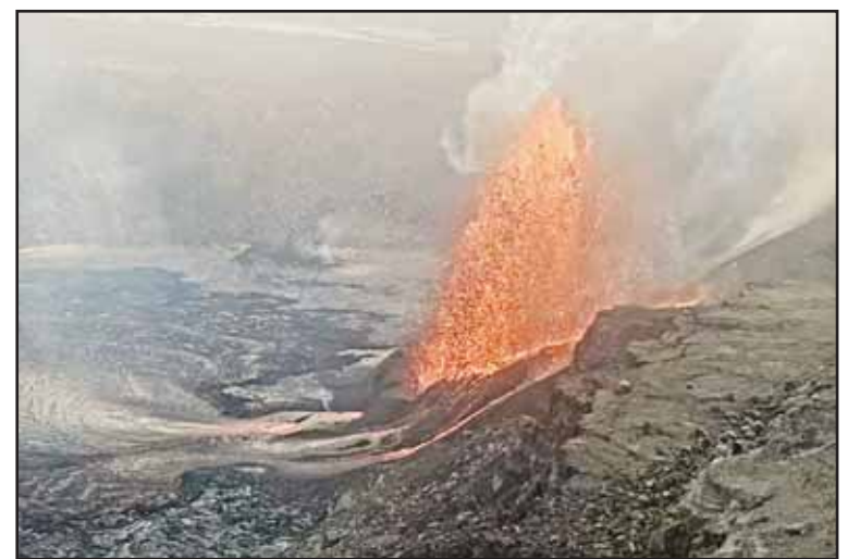
This handout photo from the US Geological Survey shows lava erupting from Halemaumau Crater at the summit of Kilauea volcano inside Hawaii Volcanoes National Park, Hawaii, on Feb 11.

That's a bit behind the ambitious schedule that Johnson had set in January even as he now insists "we are right on the schedule that we need to be on."