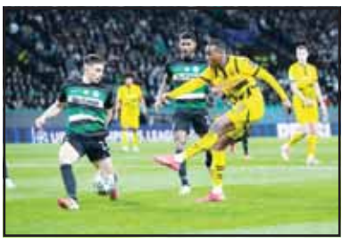
Dortmund's Pascal Gross scores his side's second goal during the Champions League playoff first leg soccer match between Sporting CP and Borussia Dortmund at the Alvalade stadium in Lisbon, Portugal.