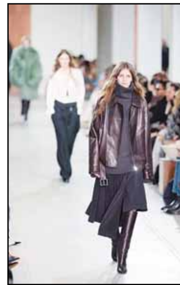
Models walk the runway during the Michael Kors Fall/Winter 2025 fashion show as part of New York Fashion Week on Tuesday, Feb. 11, at Terminal Warehouse in New York.

way. The show opened with softly tailored menswear jackets paired with long flowing skirts or slouchy suit pants.