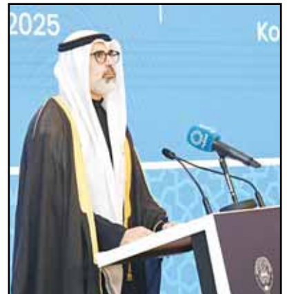
Deputy Foreign Minister Sheikh Jarrah Jaber Al-Ahmad Al-Sabah delivered a speech during the forum's opening session.

He stated that Kuwait's hosting of this forum stems from its firm belief in joint Islamic action and as a continuation of its prominent role in supporting efforts aimed at establishing the International Islamic Court of Justice. He added "these