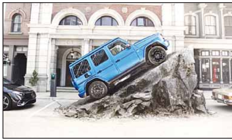
The all-new Mercedes-Benz G 580

With the all-new Mercedes-Benz G 580 with EQ Technology the brand with the three-pointed star presents the first fully electric variant of its off-road icon. It symbolizes the fusion of tradition and progress like no other. The all-new electric G-Class remains true to the model's character, retaining its angular silhouette including all iconic elements. Like the conventionally powered variants, its body is built on a ladder frame. The development team has modified and reinforced this to integrate the electric drive. Also retained is the combination of independent front suspension with double wishbones and newly developed rigid rear axle. The high-voltage lithium-ion battery integrated into the ladder frame ensures a low centre of gravity. With its usable capacity of 116 kWh, it provides sufficient energy for ranges of up to 473 kilometers according to WLTP. Throughout its more than 45-year history, the G-Class has always used the most modern drive technology available. So, it's entirely fitting that