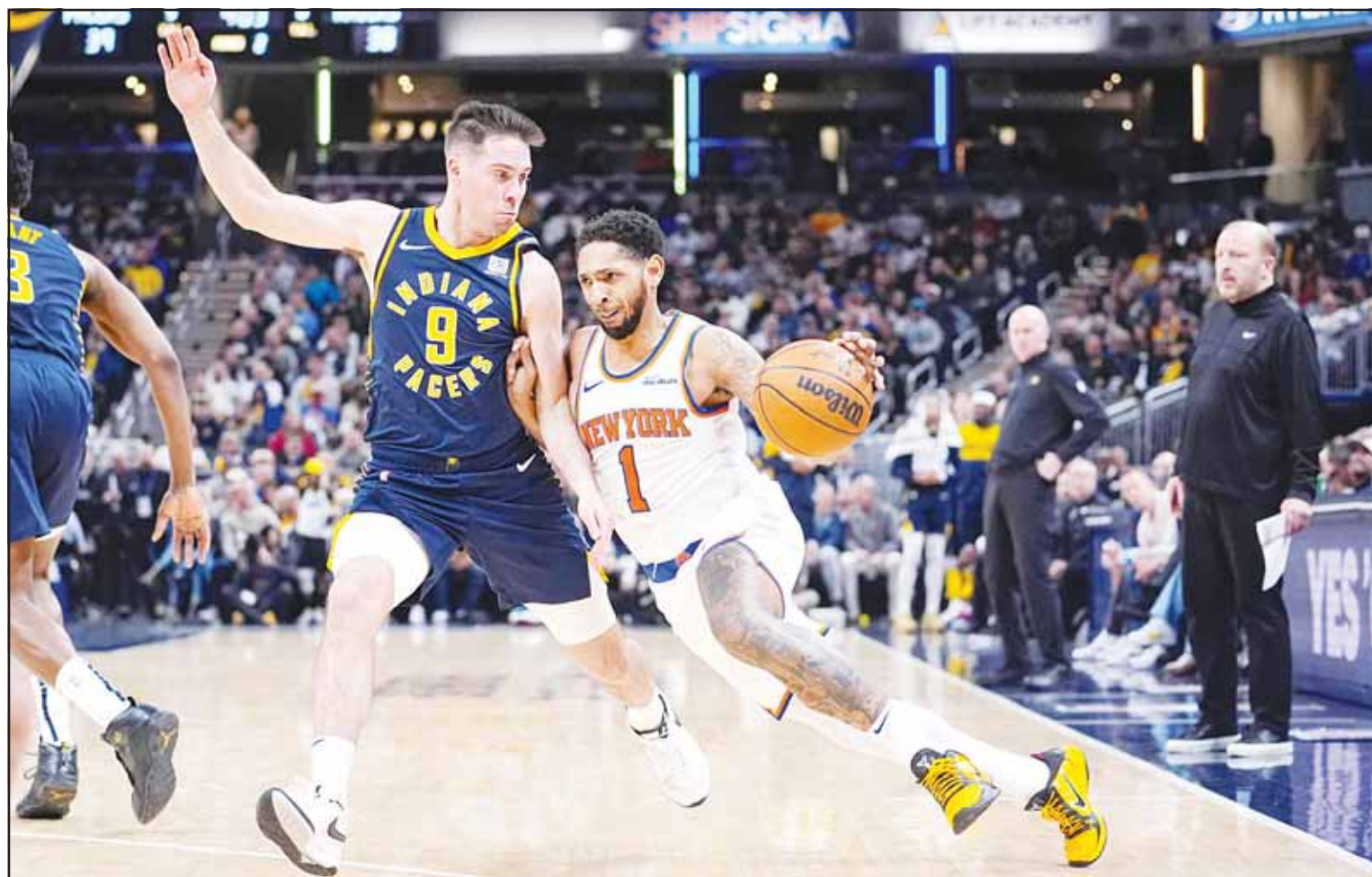
New York Knicks guard Cameron Payne (1) drives on Indiana Pacers guard T.J. McConnell (9) during the first half of an NBA basketball game in Indianapolis.

CHICAGO, Feb 12, Malik Beasley made seven 3-pointers and finished with 24 points, and the Detroit Pistons built a franchise-record, 42-point halftime lead on the way to a 132-92 romp over the Chicago Bulls on Tuesday night.