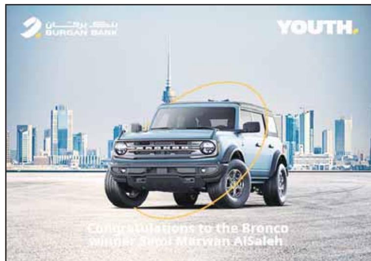
Burgan Bank's Youth Account car draw.

Al-Hassad represents an excellent addition to KFH's comprehensive suite of financial products, offering a unique opportunity for customers in which the deposited amounts are invested in Al-Hassad based on the Wakala principle.