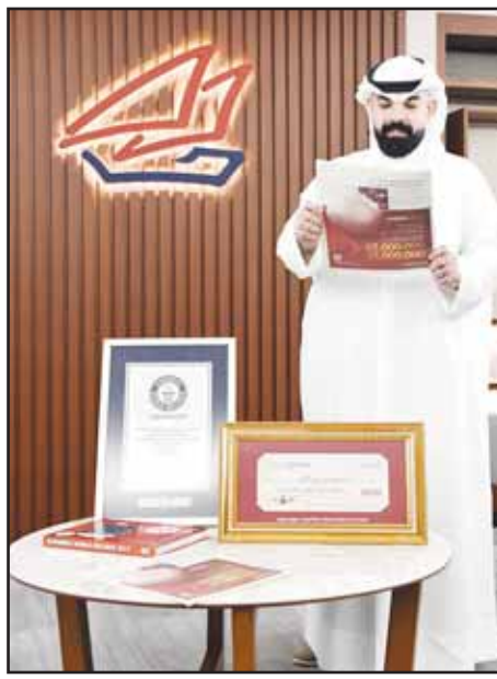
The largest prize in the world according to the Guinness Book of Records.

The draw will be broadcast live on 360 FM and Gulf Bank's official social media platforms, bringing the excitement to audiences across Ku-