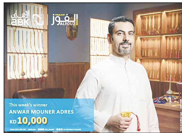
ABK's Alfouz account winner.

With a KD 100,000 quarterly draw, in addition to an exciting KD 20,000 monthly draw, the Alfouz account continues to surpass