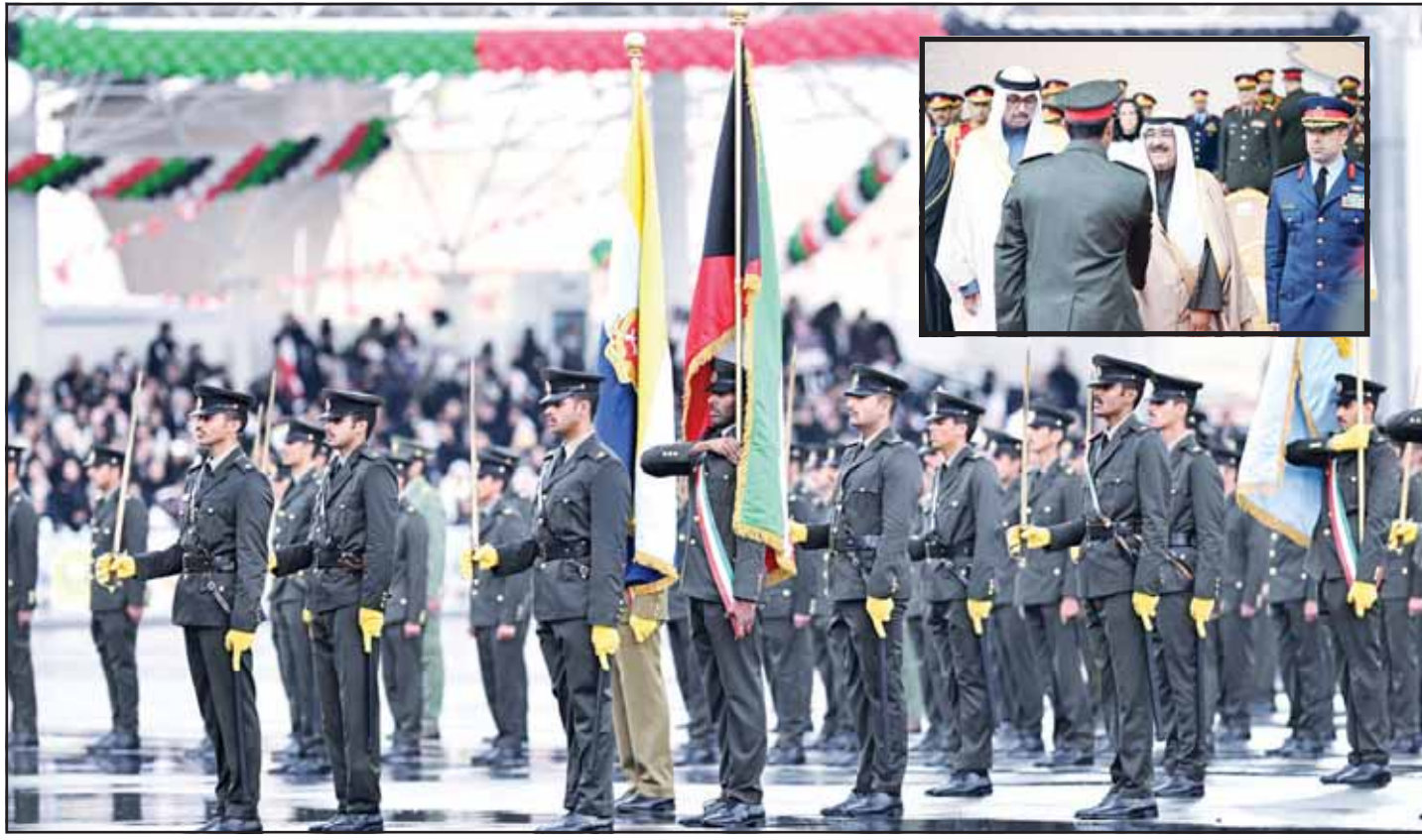
Military parade for the graduation ceremony of the 50th batch of officer students at Ali Al-Sabah Military College. Inset: His Highness the Amir Sheikh Meshal Al-Ahmad Al-Jaber Al-Sabah patronizes and attends the graduation ceremony of the 50th batch of students at Ali Al-Sabah Military College.