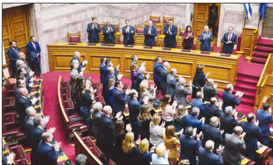
Lawmakers of the New Democracy's ruling party applaud after the election of former Parliament Speaker Constantine Tassoulas as Greece's new president at the Parliament, in Athens, Greece on Feb 12.

Some U.S. allies worry that a hasty deal might be clinched on terms that aren't favorable to Ukraine. On top of that, Trump appears to believe that European countries should take responsibility for Ukraine's security going forward.