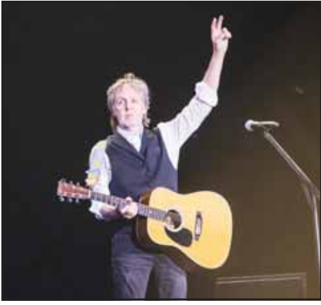
Paul McCartney performs at the Glastonbury Festival in Worthy Farm, Somerset, England, on June 25, 2022.