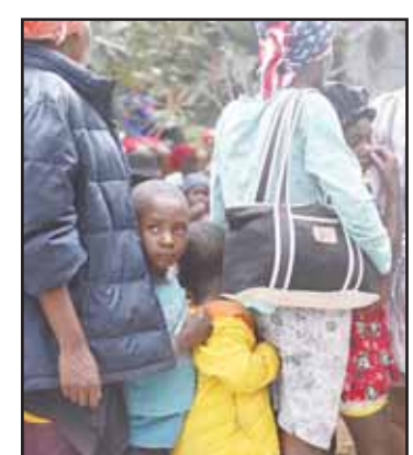
People line up to receive food at a shelter for families displaced by gang violence in the Kenscoff neighborhood of Port-au-Prince, Haiti on Feb 3.

Nearly two million people are on the verge of starvation in Haiti, and more