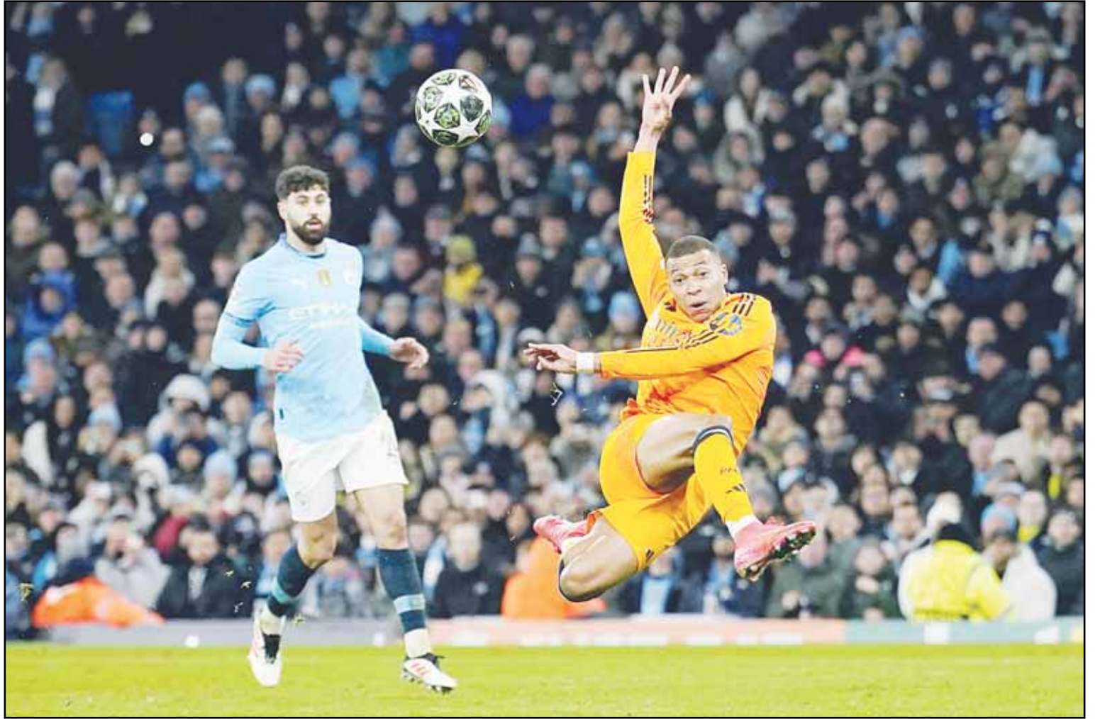
Real Madrid's Kylian Mbappe scores his side's first goal during the Champions League playoff first leg soccer match between Manchester City and Real Madrid at the Etihad Stadium in Manchester, England.

Having made hard work of the new-look league phase of the tournament, it would take a major upset in the second leg in Paris to deny PSG a place in