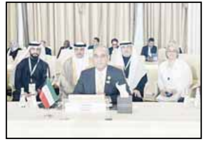
The delegation of the State of Kuwait participating in the conference headed by Dr. Mohammad Al-Jassar, the Secretary-General of the National Council for Culture, Arts and Letters.

In turn, the OIC Secretary General, Hussein Taha, said that cultural in its comprehensive concept represents a tool for promoting eternal Islamic values based on science and human dignity, enhancing the Islamic cultural heritage, and encouraging the exchange of expertise