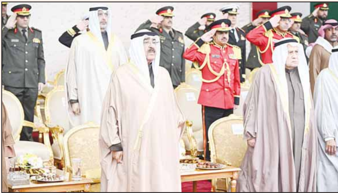
His Highness the Amir attends the graduation ceremony of the 50th batch of officer cadets at Ali Al-Sabah Military College in the presence of His Highness the Crown Prince.