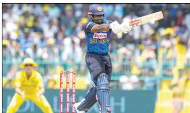
Sri Lanka's Captain Charith Asalanka plays a shot during the first ODI cricket match between Sri Lanka and Australia in Colombo, Sri Lanka.