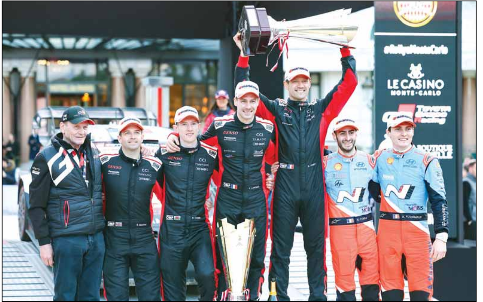
TOYOTA GAZOO Racing World Rally Team celebrates with the trophy.

of motorsports, including Formula One, the World Endurance Championship (WEC), and the Nürburgring 24 Hours endurance race. Toyota's participation in these events was overseen by separate entities within the company until April 2015, when Toyota established TGR. To consolidate all of its motorsport activities under one in-house brand. Represent-