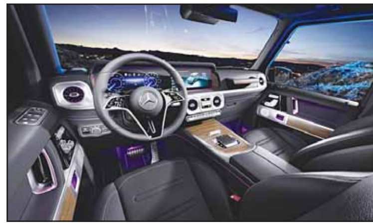
Interior of the all-new Mercedes-Benz G 580.

The all-new Mercedes-Benz G 580 with EQ Technology is equipped with the MBUX infotainment system