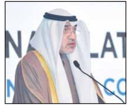
Acting Prime Minister and Minister of Interior Sheikh Fahad Youssef Saud Al-Sabah delivers the opening speech on the occasion of the launch of the Sixth Arab Regional Forum for Risk Reduction.

It also emphasizes the need to develop and update comprehensive disaster loss databases and risk assessments to support