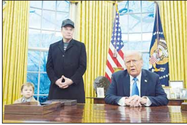
US President Donald Trump speaks as he is joined by Elon Musk, and his son X Æ A-Xii, in the Oval Office at the White House on Feb 11 in Washington.

"We are moving fast, so we will make mistakes, but we'll also fix the