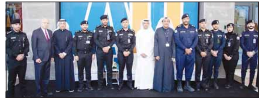
Group photo from the event.

The Sixth Arab Regional Platform for Disaster Risk Reduction, themed "Building Resilient Arab Communities: From Understanding to Action," was officially opened by Acting Prime Minister and Minister of Interior Sheikh Fahad Youssef Saud Al-Sabah on Monday.