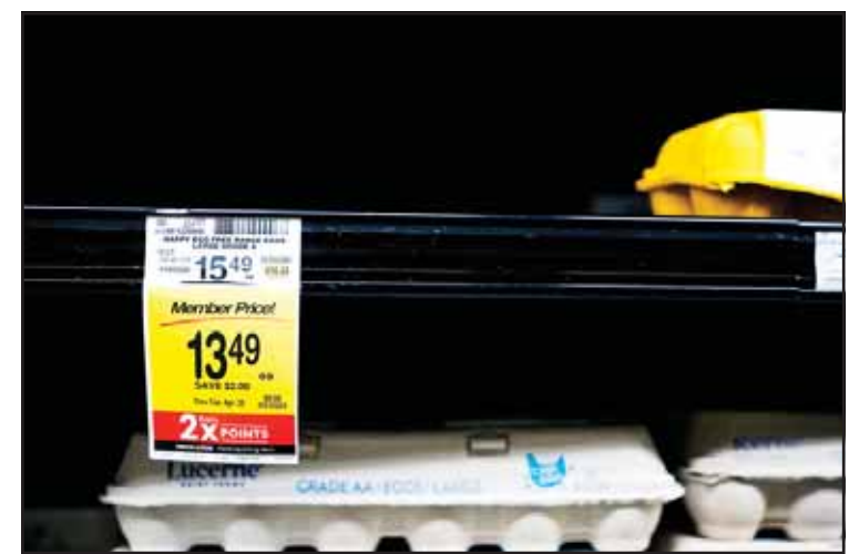
An empty shelf of free range eggs is seen at a Safeway, Monday, Jan. 27, 2025, in Seattle.