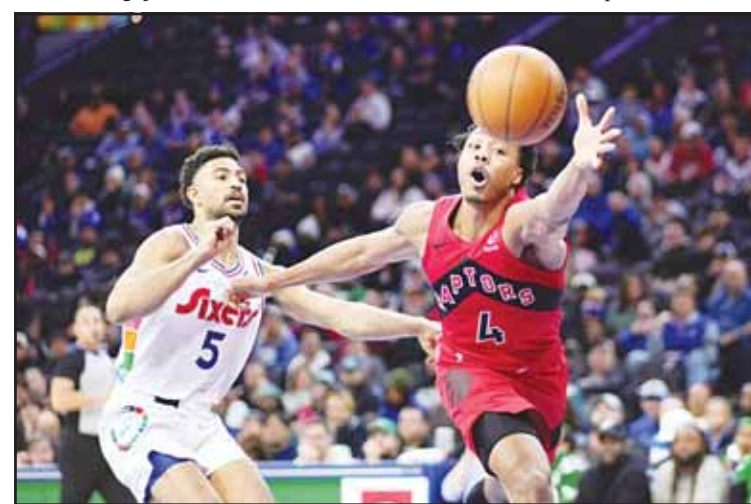
Toronto Raptors' Scottie Barnes, right, reaches for a pass against Philadelphia 76ers' Quentin Grimes during the second half of an NBA basketball game in Philadelphia.

Joel Embiid had 27 points and 12 rebounds, but the 76ers (20-33) fell a season-worst 13 games under .500. Jared Butler had 15 points off the bench, and Paul George added 12.