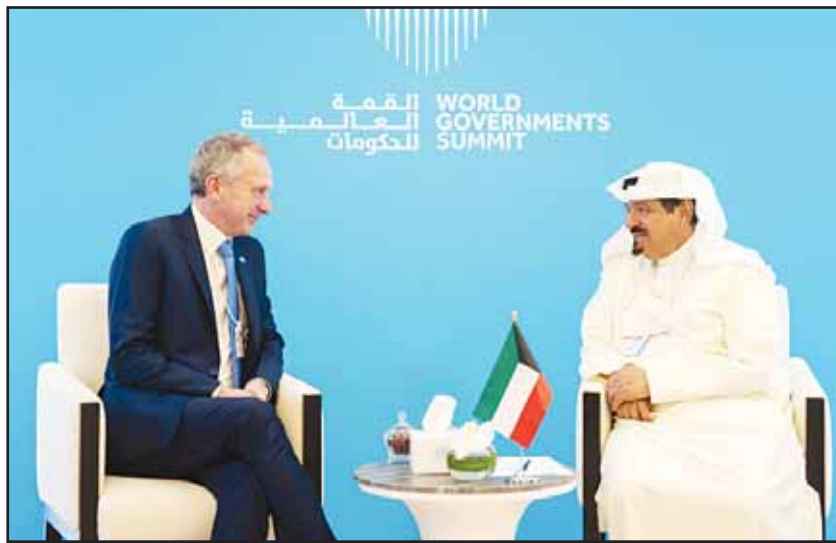
HH the Prime Minister Sheikh Ahmad Abdullah Al-Ahmad Al-Sabah receives the Hewlett-Packard (HP) CEO Enrique Lores.