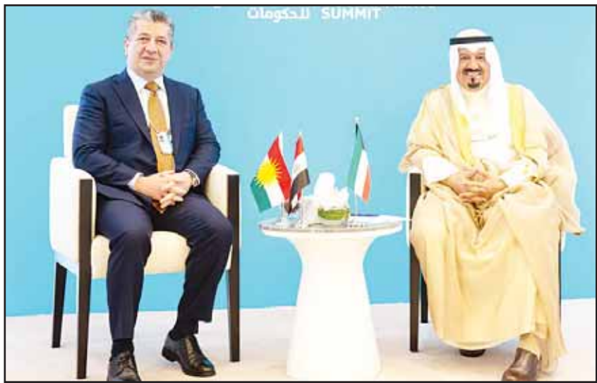
HH the Prime Minister Sheikh Ahmad Abdullah Al-Ahmad Al-Sabah meets his Kurdish counterpart Masrouf Barzani.

Kuwait Airport 18 13 Abdaly 18 09 Bubyan 17 12 Jahra 18 13 Failaka Island 18 14 Salmiyah 16 14 Ahmadi 17 09 Jal Aliyah 17 11