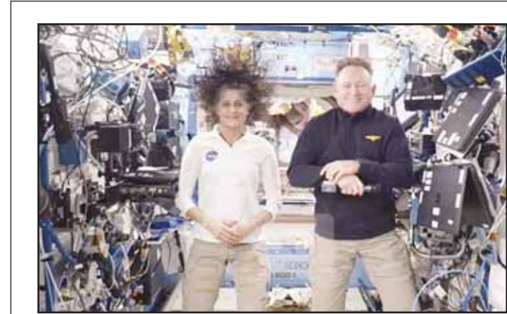
This image made from a NASA live stream shows NASA astronauts Suni Williams and Butch Wilmore during a press conference from the International Space Station, Sept 13, 2024. (AP)

By combining environmental data with genetic information, we hope to improve how drugs work in people by figuring out whether chemicals in their environment or diet are altering how they process a given drug. This includes whether the administered drugs are at therapeutic levels, how the drugs and chemicals are interacting with each other, and determining whether other variables are affecting intended drug effects. (AP)