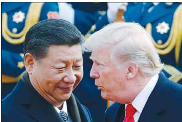
U.S. President Donald Trump, right, chats with Chinese President Xi Jinping during a welcome ceremony at the Great Hall of the People in Beijing on Nov. 9, 2017.

A reciprocal tariffs order could amount to a substantial tax hike to be shouldered largely by U.S. consumers and businesses as the Census Bureau reported that the country had total imports of $4.1 trillion last year. The tariffs could set off retaliatory measures by trading partners that could roil growth around the globe and reset where