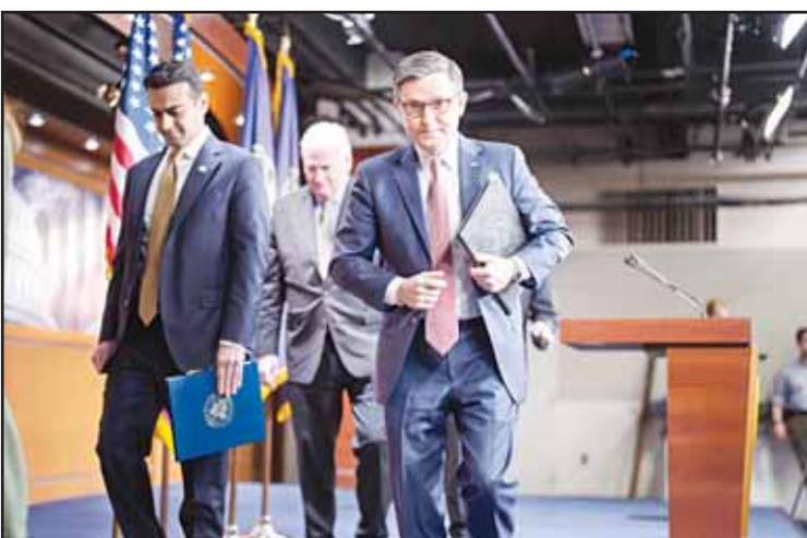
US Speaker of the House Mike Johnson, R-La. (center), departs a news conference joined (from left) by Rep Abraham Hamadeh, R-Ariz, and House Majority Whip Tom Emmer, R-Minn, after discussing work on a spending bill, at the Capitol in Washington on Feb 11.

Graham's committee is taking up a budget plan for more border and defense spending on Wednesday and