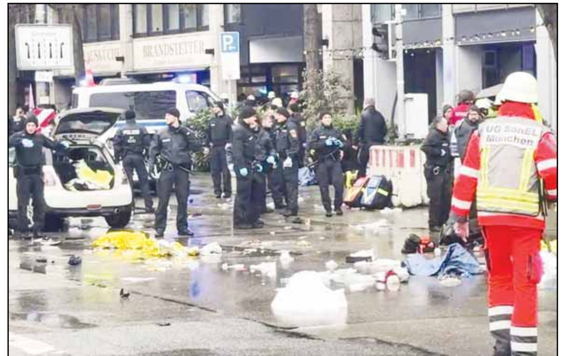
Emergency services attend the scene of an accident after a driver hit a group of people in Munich, Germany on Feb 13.