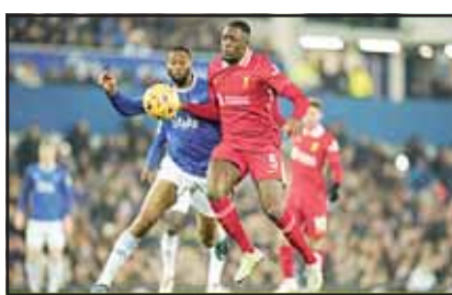
Everton's Beto, left, challenges for the ball with Liverpool's Ibrahima Konate during the English Premier League soccer match between Everton and Liverpool, Liverpool, England. The match ended 2-2. - See Page 15