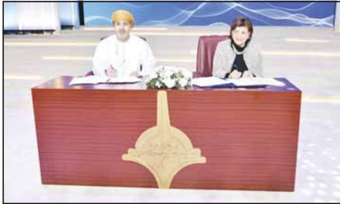
Memorandum of Understanding signed between the Arab and Gulf Networks for Quality Assurance in Higher Education in the GCC.