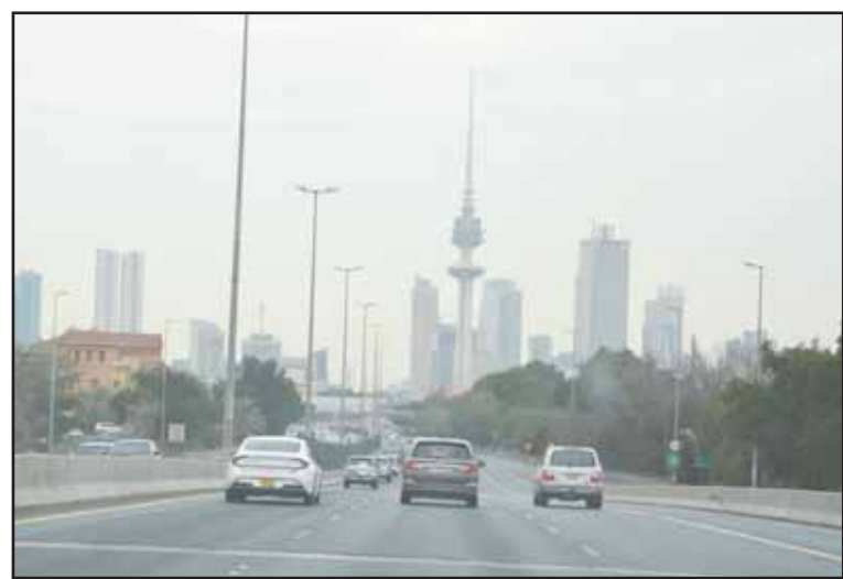
Kuwait's skyline wrapped in a moody mist as vehicles navigate through a rain-drenched city, enduring three days of rainfall, and a blanket of low, drifting clouds.

He added "this decision is expected to contribute to enhancing the stability of the Kuwaiti family, reducing divorce rates and supporting social development; thus, achieving Kuwait's vision of building a cohesive society, which protects the rights of its members and guarantees a decent life for them."