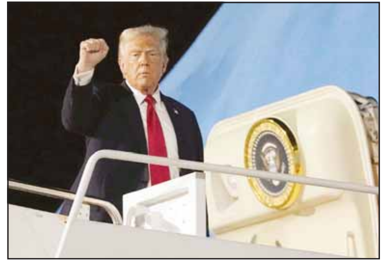
US President Donald Trump boards Air Force One at the Naval Air Station Joint Reserve Base in New Orleans on Feb 9.

"No person shall be elected to the office of the President more than twice," begins the 22nd Amendment,