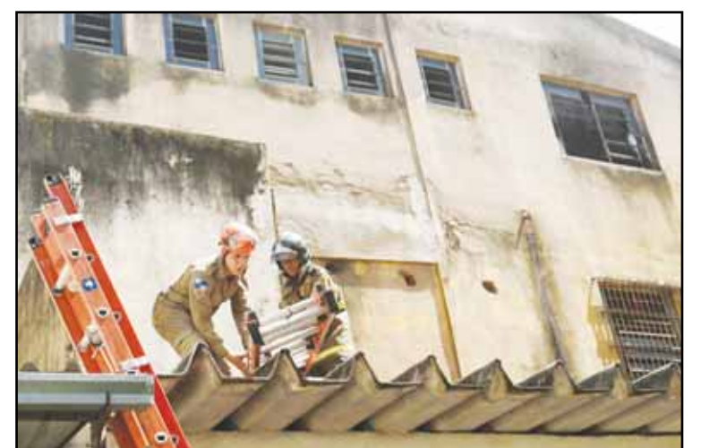
Firefighters move a ladder after a fire destroyed a factory that produces Carnival costumes for the lower division samba schools in Rio de Janeiro on Feb 12.

The Maximus factory where the fire occurred is one of the most used by