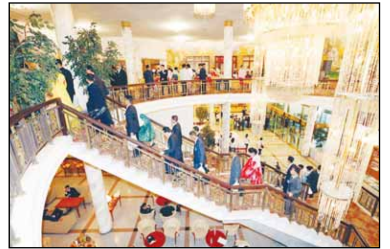
North Koreans arrive to meet their South Korean relatives during a separate family reunion meeting at the Diamond Mountain resort in North Korea, on Aug 21, 2018.

Negotiations derailed in 2019 after a failed summit between Kim and US President Donald Trump, who was serving his first term, when the Americans rejected North Korea's demands for a major release of US-led economic