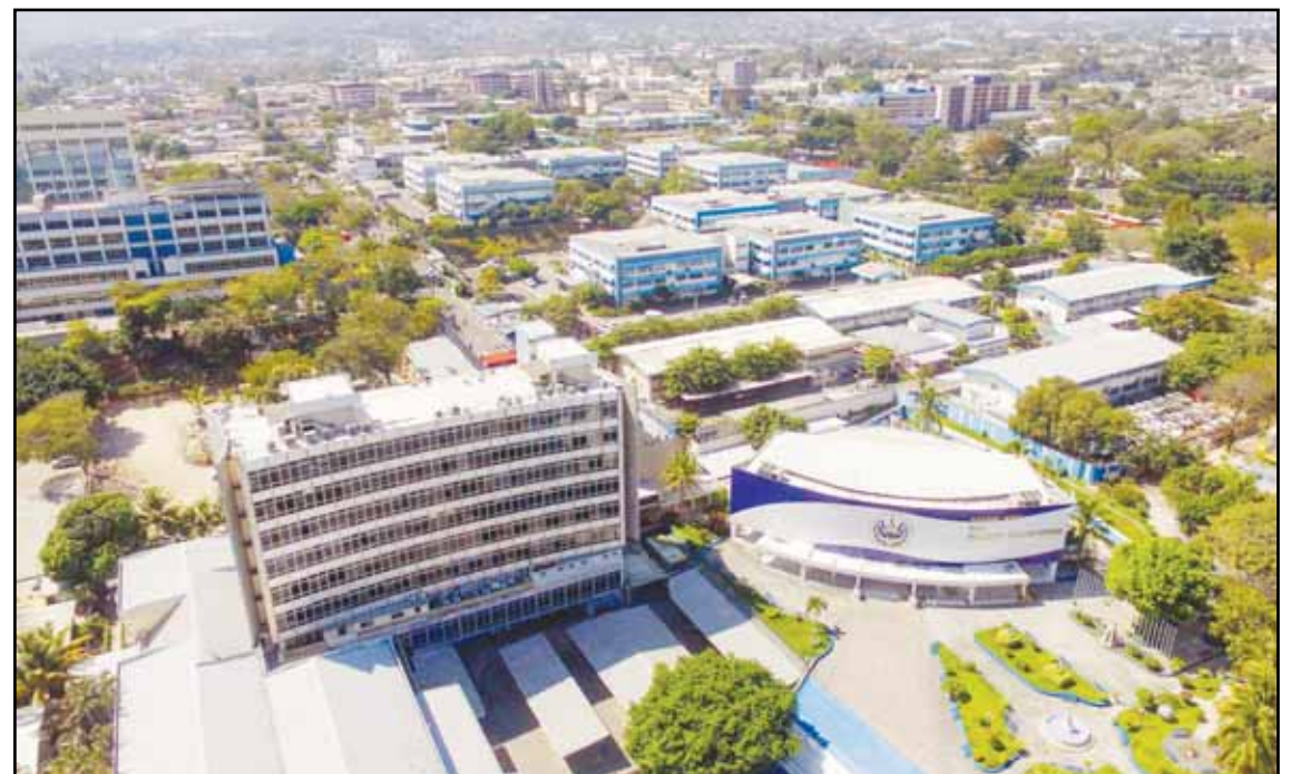
The Salvadoran Congress building is seen from the air in San Salvador, El Salvador on Feb 9, 2020.