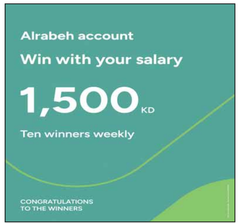
The campaign visual

KFH is keen to further meet customers' requirements and aspirations and their increasing needs as well as offer innovative and modern services, therefore achieving customer satisfaction, which is one of the fundamentals of KFH. The Bank has achieved a qualitative shift in the level of financial services by utilizing technology.