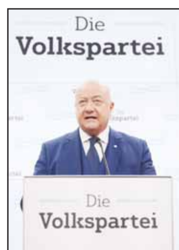
Head of Austrian Peoples' Party (OeVP) Christian Stocker addresses a news conference in Vienna, Austria on Feb 12.

Kickl's anti-immigration party, which also opposes sanctions against Russia, won Austria's parliamentary election in September. It took 28.8% of the vote and beat then-Chancellor Karl Nehammer's People's Party into second place.