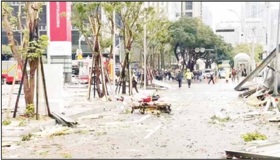
This image taken from video by Taiwan's TVBS shows debris strewn across the streets in the aftermath of an explosion at the Shin Kong Mitsukoshi department store in Taichung city in Taiwan on Feb 13.

The US installed the Typhon missile system in the northern Philippines in April 2024 as part of joint US-Philippines military drills. The Philippines promised that the deployment would be "temporary," and that the system would be withdrawn following the conclusion of the military exercises.