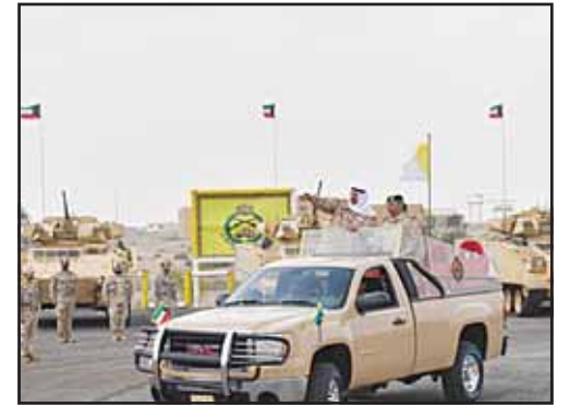
Minister of Defense Sheikh Abdullah Ali Abdullah Al-Sabah during an inspection visit to 26th Al-Soor Mechanized Brigade of the infantry corps in the Northern Region.