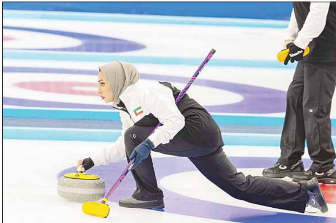
A Kuwaiti in action during curling game at the Asian Winter Games in Harbin.