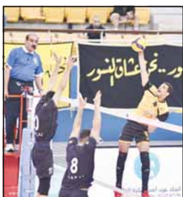
Al Ahly defends as Al-Qadisiya player goes for a spike.

RIFFA, Bahrain, Feb 13: Al-Qadisiya Club's volleyball team will play its final match in the Third West Asian Clubs Volleyball Championship today at Isa bin Rashid Hall in Riffa, Bahrain. The team will face Iraq's North Refineries at 4:30 pm, with the tournament's curtain closing shortly after, followed by the match between Al-Ahly of Bahrain and Al-Arabi of Qatar at 7:00 pm.