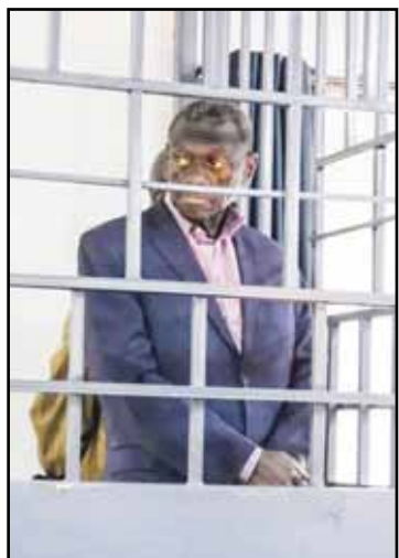
Ugandan opposition leader and four-time presidential candidate Kizza Besigye, stands in the dock at the Makindye Martial Court in Kampala, Uganda on Nov 20, 2024.

The military trial of Besigye has angered his supporters and drawn concern from rights groups. Amnesty International has called for Besigye's release, saying his "abduction clearly violated international human rights law and the process of extradition with its requisite fair trial protections."