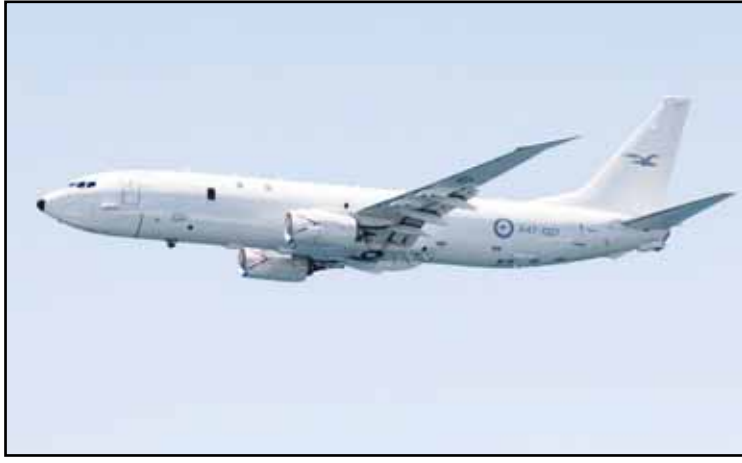
In this photo provided by the Australian Defense Force, an Australian Air Force P-8 Poseidon aircraft performs a handling display during the Newcastle Williamstown Air Show on Nov 18, 2023.

The protest highlights that while bilateral diplomatic and trade relations have improved, relations between the