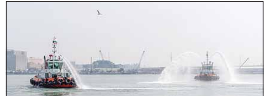
A celebration of national holidays and a review of the latest developments in this vital sector in Kuwait.

Around 657 tons of relief aid had reached Syria to support those in need especially during the winter season.