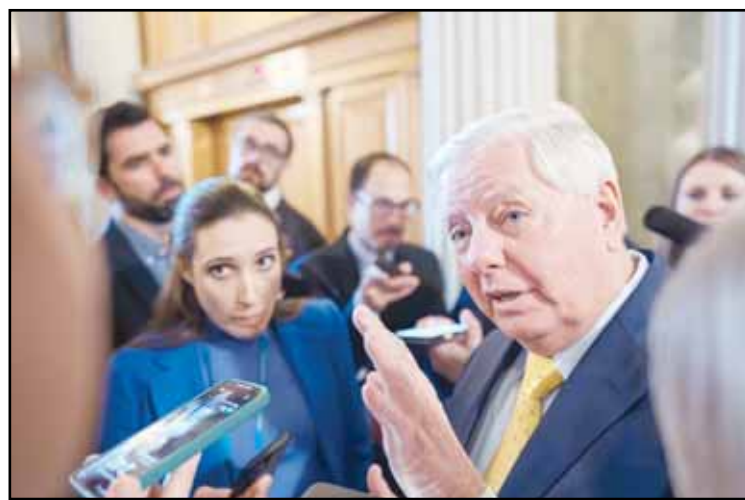
US Sen Lindsey Graham, R-SC, chairman of the Senate Budget Committee, is surrounded by reporters asking about his plans to move ahead with a spending bill, at the Capitol in Washington on Feb 11.

Budget resolutions are often considered statements of priorities. But the 45-page plan is more than just a policy blueprint as it provides specific directions to House committees to rearrange the federal money flow. GOP leaders