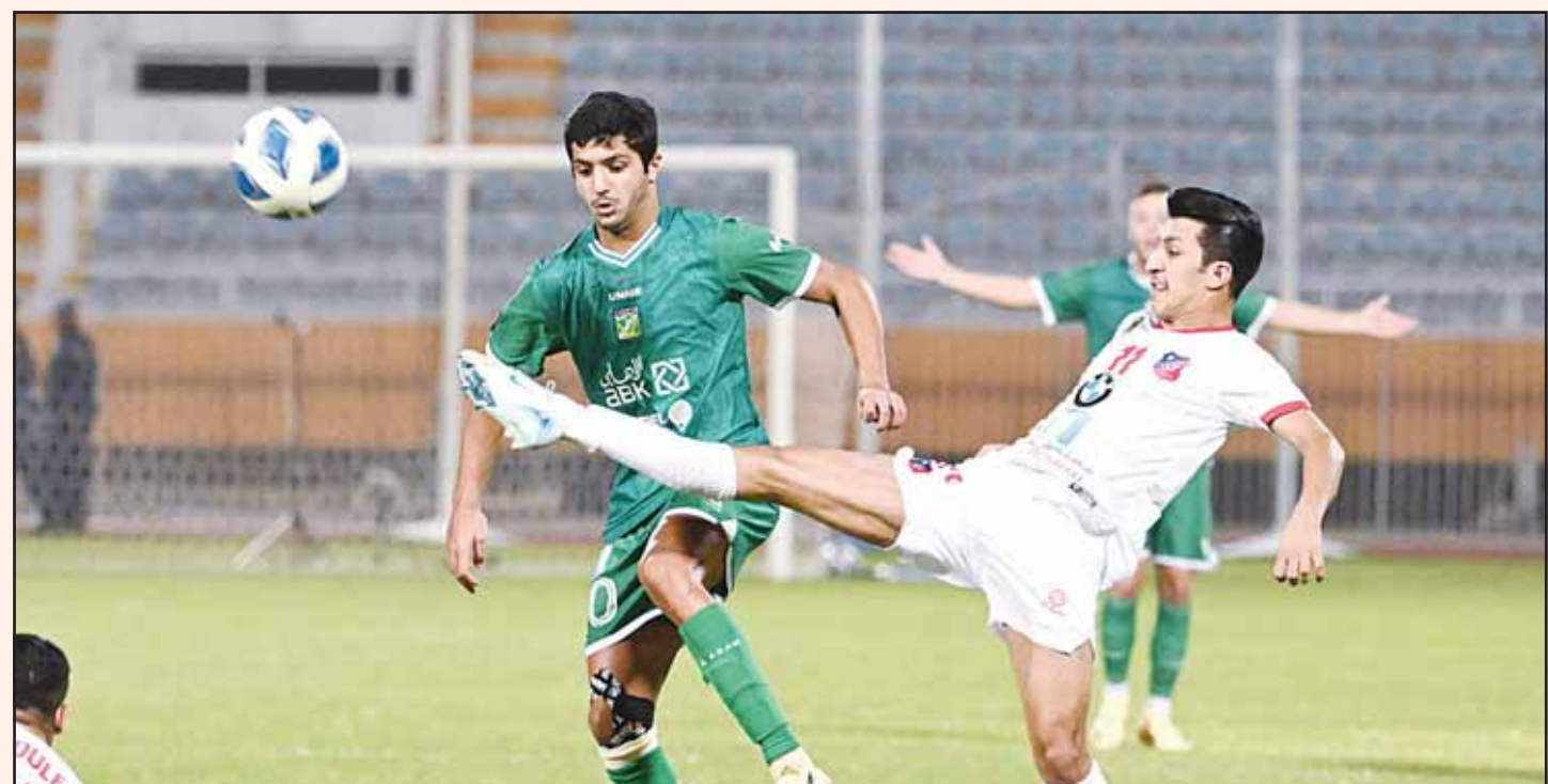
In this file photo Kuwait Club player attempts to control the ball as Al-Arabi player defends.

With crucial points at stake, this round of the Zain Premier League promises drama, intensity, and high-stakes football as teams battle for the title, top-six security, and survival.