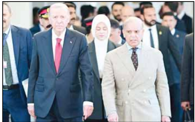
In this photo released by Press Information Department, visiting Turkish President Recep Tayyip Erdogan, (left), walks with Pakistan's Prime Minister Shehbaz Sharif, right, during a welcome ceremony, in Islamabad, Pakistan on Feb 13.

Erdogan will jointly chair bilateral strategic cooperation talks and the two sides are expected to sign a number of agreements, according to a government announcement.