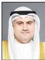
Nasser Al-Sumait, Minister of Justice

He cited statistics confirming the registration of 1,145 underage marriages in 2024 -- 1,079 girls and 66 boys. It also showed that the rate of divorce among minors is double that of adults. He pointed out this confirms the importance of raising the marriage age to ensure that spouses