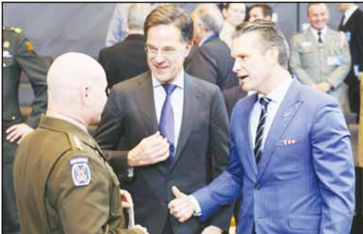
United States Secretary of Defense Pete Hegseth, right, speaks with NATO Secretary General Mark Rutte, center, and NATO's Supreme Allied Commander - Europe General Christopher Cavoli during a meeting of the North Atlantic Council in defense ministers format at NATO headquarters in Brussels on Feb 13.

But Hegseth's French counterpart, Sébastien Lecornu, described the wrangling over greater defense spending as "a false debate," saying that governments and parliaments across Europe are already approving more weapons purchases and bigger military budgets while helping Ukraine stave off an invasion.