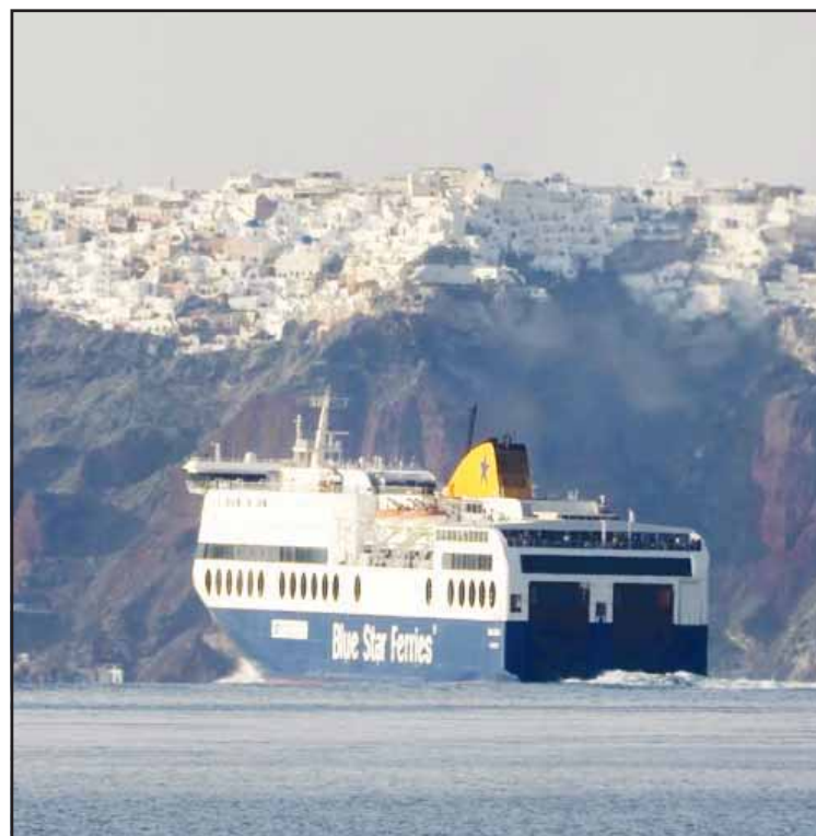
A regularly scheduled ferry departs from Santorini to Athens' port of Piraeus, after a spike in seismic activity raised concerns about a potentially powerful earthquake in Santorini, southern Greece on Feb 3.

The emergency declaration will facilitate rapid deployment of resources and emergency services. The region has already seen a significant mobilization of fire departments, police, coast guard, and armed forces mostly on Santorini where thousands of residents and seasonal workers have left the island.