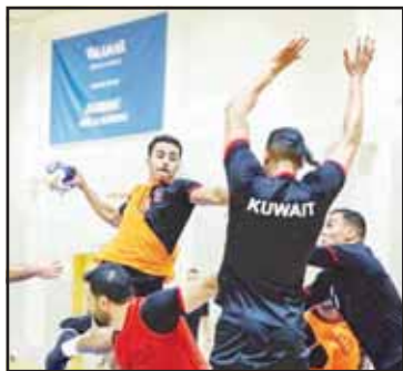
Kuwait Club intensifies training for the opening match against Al-Arabi.

The Kuwait team prepared for this Gulf Championship through a training