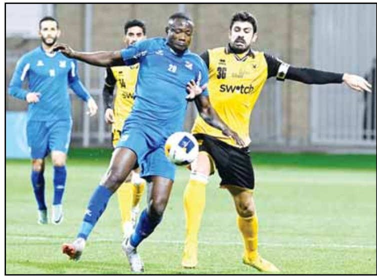
Al-Qadsia player tries to take the ball from Al-Tadamon player.