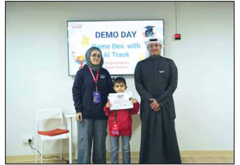
KFH representative with the children who graduated from the Code Juniors program.

Featuring over 50 different programs benefiting 1700 kids