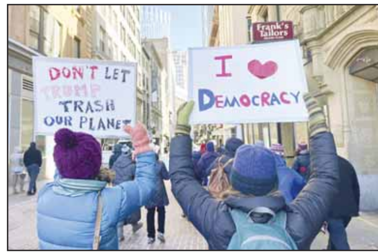
Hundreds of protesters march in downtown Boston and chant 'stop the coup' to condemn a 'billionaire takeover' of government and Trump administration policies.

To say that most Canadian leaders aren't interested in becoming a state would be an understatement. Ontario Premier Doug Ford, head of Canada's most populous province, has spun out