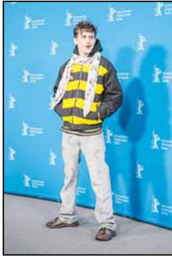
Timothee Chalamet poses for photographers at the photo call for the film 'A Complete Unknown' at the International Film Festival, Berlinale, in Berlin, Friday, Feb. 14,

Haynes said the Berlinale "has always had a strength of conviction and an openness to challenging and political discourse and bringing that