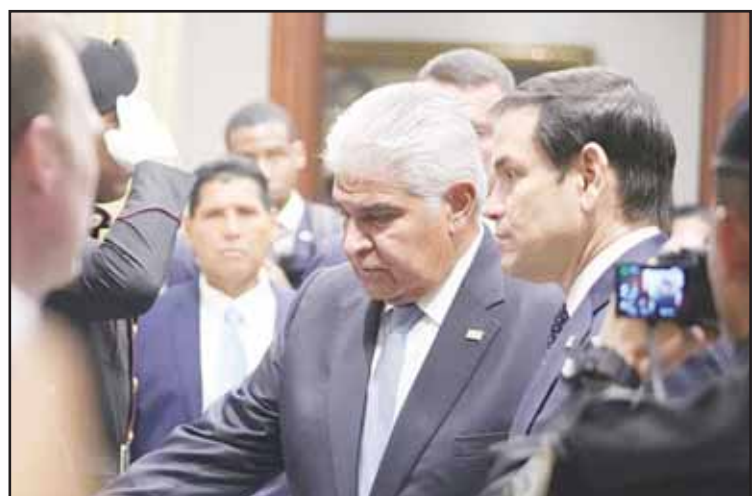
Panama's President Jose Mulino, left, and US Secretary of State Marco Rubio arrive for a meeting at the presidential palace in Panama City on Feb 2.