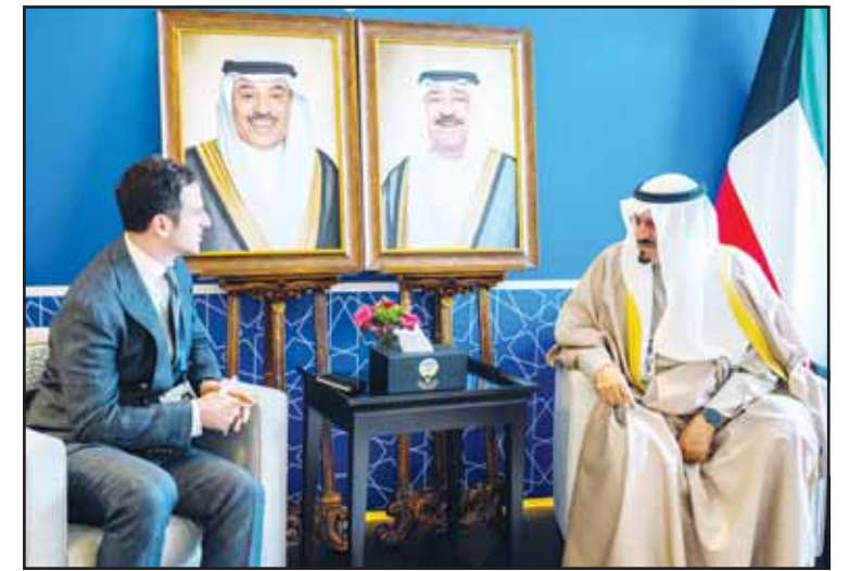
His Highness the Prime Minister of Kuwait Sheikh Ahmad Abdullah Al-Ahmad Al-Sabah meets President of the Global Affairs of Goldman Sachs.