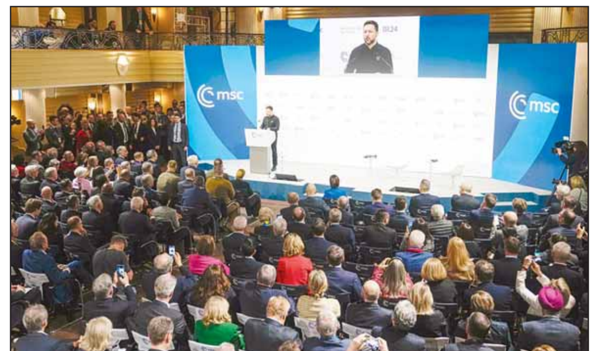
Ukraine's President Volodymyr Zelenskyy speaks during the Munich Security Conference at the Bayerischer Hof Hotel in Munich, Germany on Feb 15.

Government officials and local civil society leaders did not immediately comment, though Congo's Communications Ministry said the rebels had violated ceasefire agreements and attacked Congolese troops working to avoid urban warfare and violence in Bukavu.