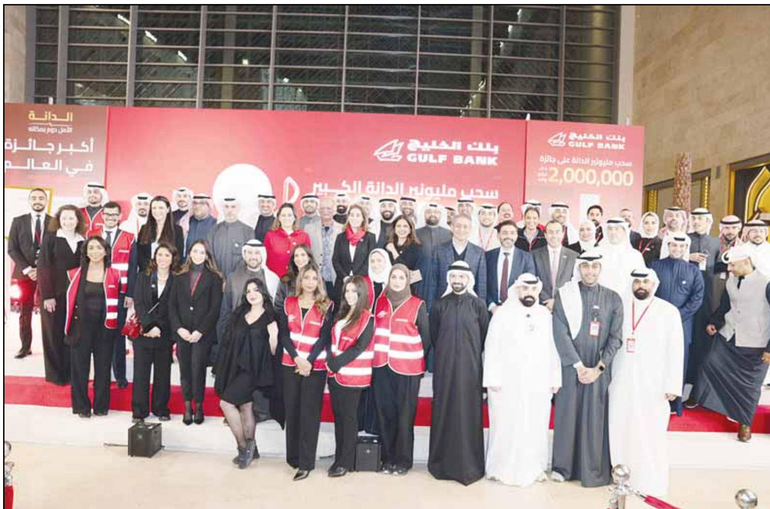
Gulf Bank officials in a group photo.

The AIDanah Savings Account is one of the best savings accounts in Kuwait, offering regular draws with valuable prizes and numerous benefits for account holders. Gulf Bank has raised the grand prize from KD 1.5 million to KD 2 million,