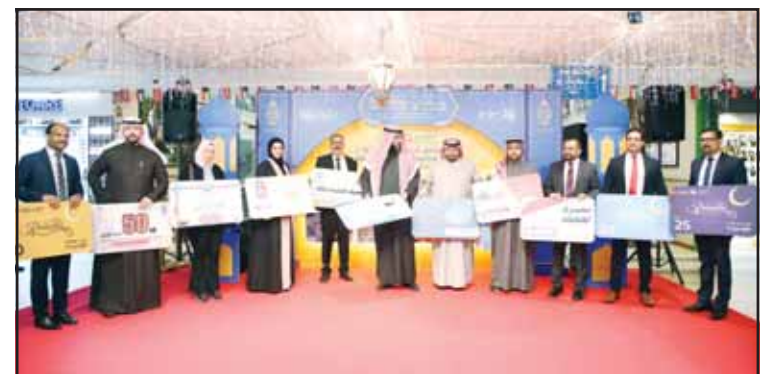
Photos from the launch of LuLu Hypermarket's Ramadan Souq at the Al-Rai outlet.