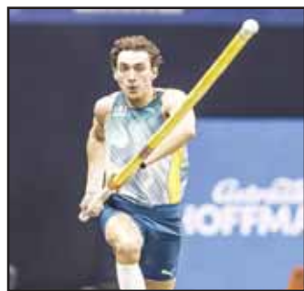
Armand Duplantis from Sweden, competes in the pole vault competition at the indoor track and field meet, on Feb. 14, 2025, in Berlin.

Duplantis needed two attempts to clear 6.10, putting it down to "rust" in his first competition since September. It's the best indoor mark so far this year. "It was a good season-open-