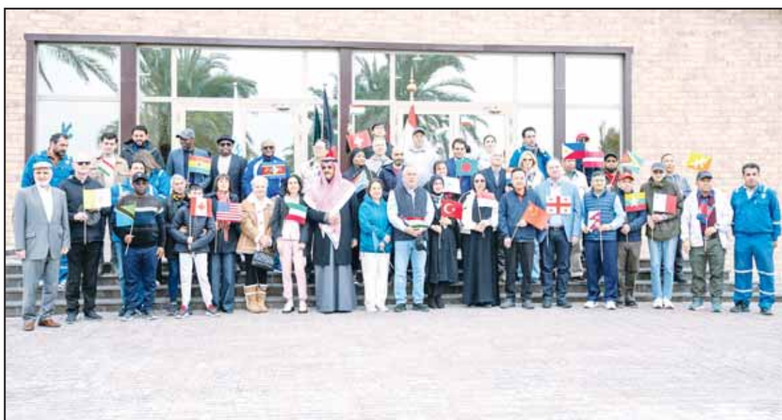
Diplomatic missions in Kuwait come together for a group photo at the Sports and Environmental Day, highlighting their commitment to environmental awareness and global collaboration.