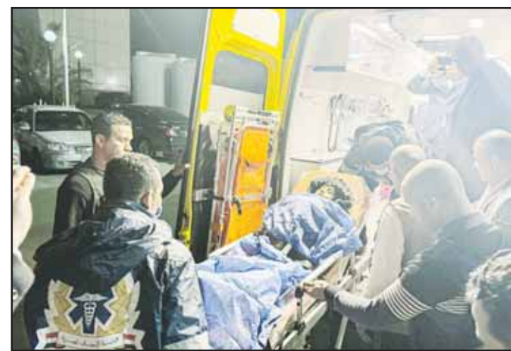
A Palestinian child is transferred to El Arish General Hospital in North Sinai Province, Egypt, on Feb. 11, 2025.