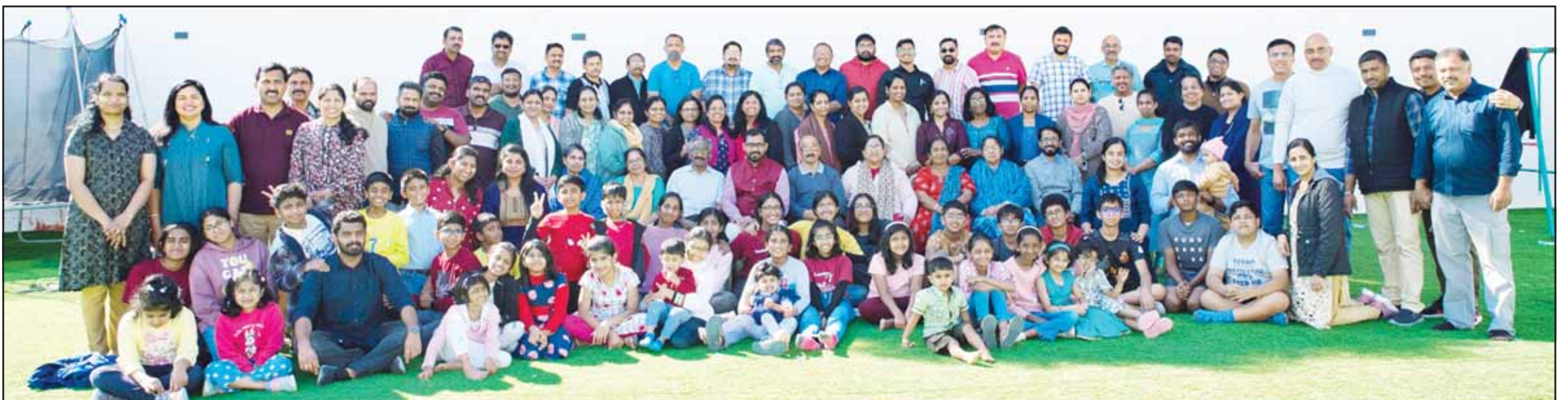
A group photo from the event.