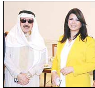
Editor-in-Chief Al-Jarallah with media figure Mona El-Shazly.