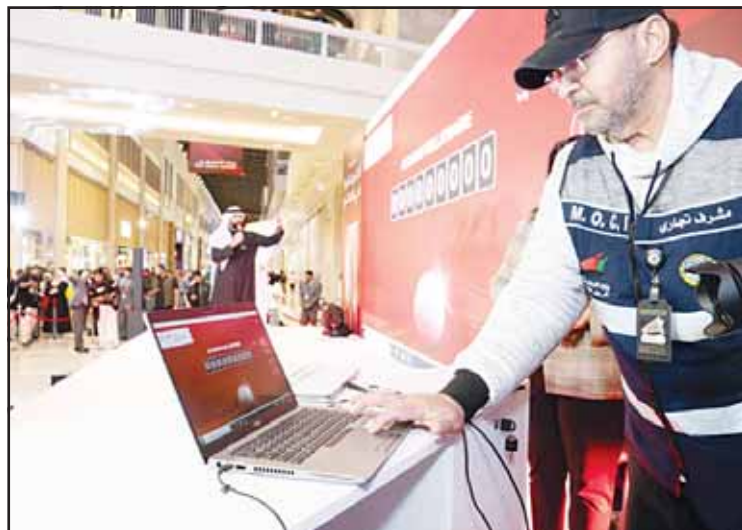
Representative of the Ministry of Commerce and Industry conducts the draw.

thinking financial institution dedicated to delivering an exceptional customer experience.