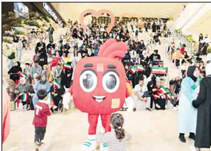
Neo account mascot along with a fun drawing activity for children during the grand draw event.