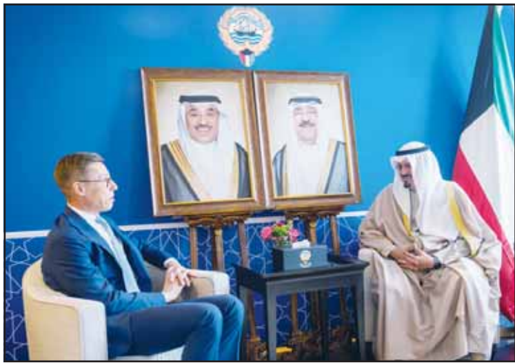
His Highness the Prime Minister of Kuwait Sheikh Ahmad Abdullah Al-Ahmad Al-Sabah meets with President Alexander Stubb, of Finland.