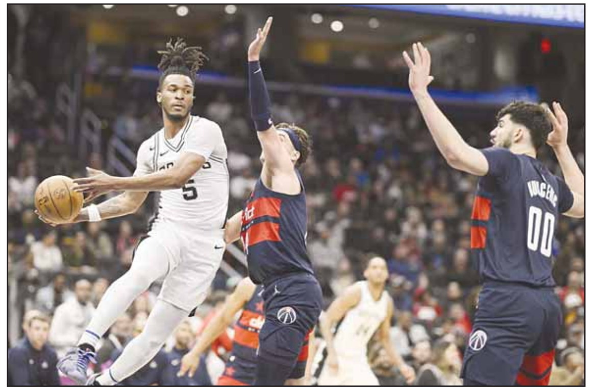
San Antonio Spurs guard Stephon Castle (5) looks to pass the ball against Washington Wizards forwards Corey Kispert, center, and Tristan Vukcevic (00) during the first half of an NBA basketball game, on Feb. 10, 2025, in Washington.

Miller had 14 points for Team G League. Houston's Amen Thompson had 10 points for Team M.