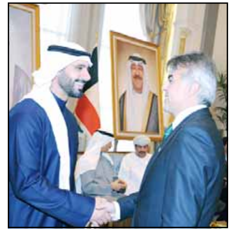
Sheikh Mubarak welcomes Syrian media figure Musa Al-Omar.