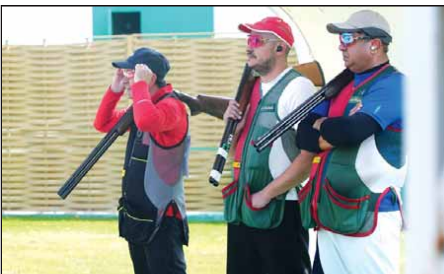
Some of the participants in the tournament.

DOHA, Feb 15, (KUNA): The second edition of the Amir of Qatar Grand Prix for Shotgun kicked off on Friday at the Lusail Shooting Complex in Doha, with the participation of around 250 shooters representing 34 countries.