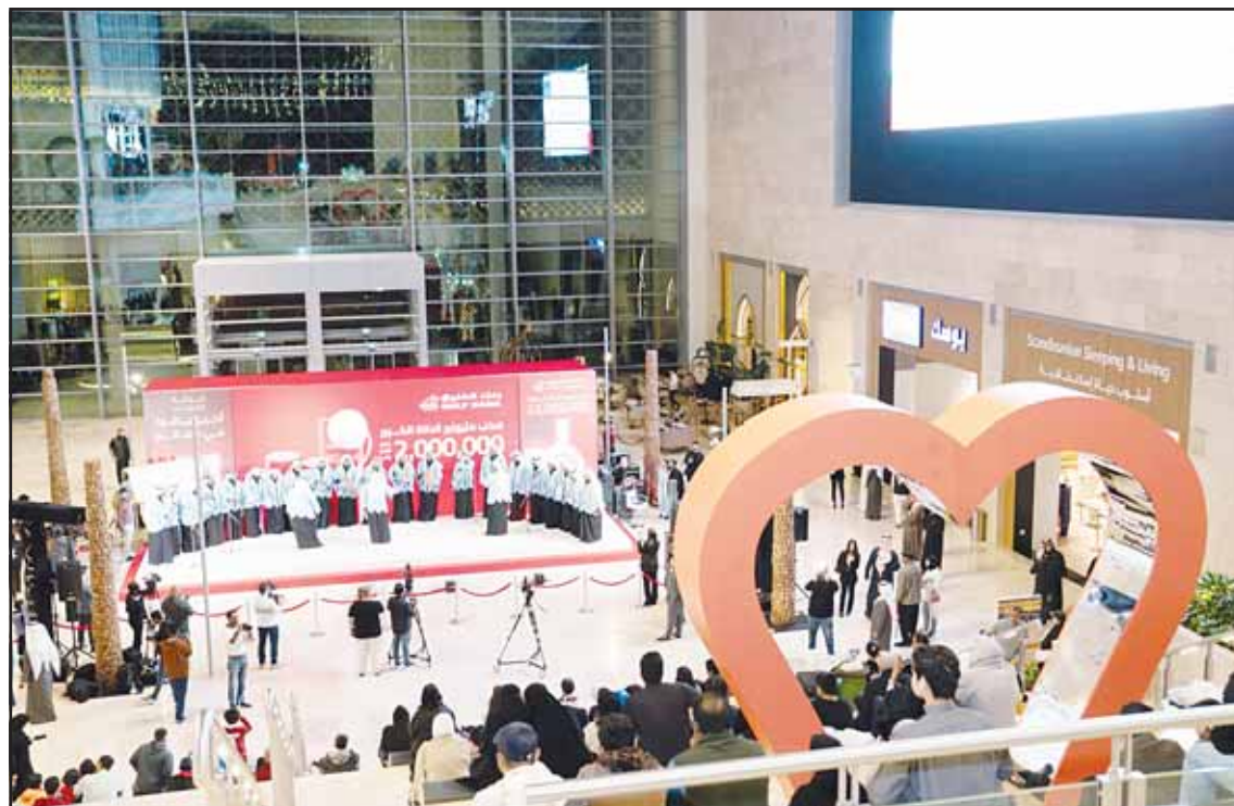
Kuwait Television Band presents diverse selection of folk, national, and traditional songs.