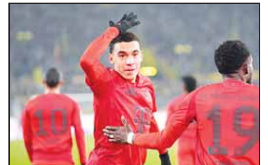
Bayern's Jamal Musiala celebrates after scoring during their German Bundesliga soccer match against Borussia Dortmund at the Signal-Iduna Park in Dortmund, Germany, Saturday, Nov. 30, 2024.

He has scored 10 goals and set up four more in the Bundesliga this season, while he has 43 goals in 132 league appearances altogether for the club, as well as six goals in 43 Champions League appearances.