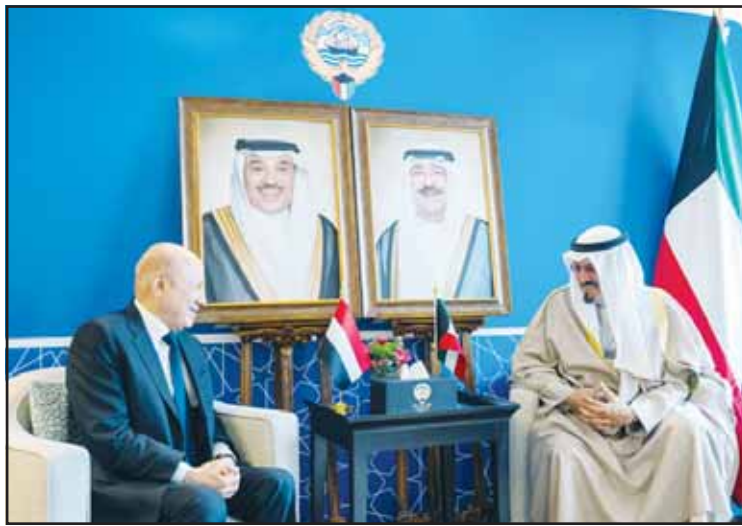
His Highness the Prime Minister of Kuwait Sheikh Ahmad Abdullah Al-Ahmad Al-Sabah meets Dr. Rashad Mohammad Al-Alimi, President of Yemen's Presidential Leadership Council.