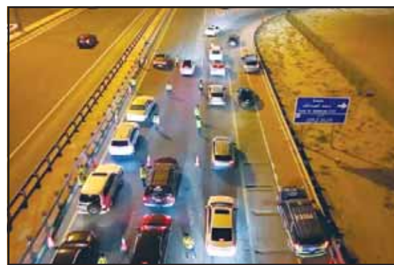
A view from the bridge.

A security source said the Operations Unit at the Interior Ministry received information about the incident. Police patrols and ambulances rushed to the accident, but the two expatriates already succumbed to their wounds due to the impact of the fall. The source added that the Kuwait Fire Force and Kuwait Municipality will investigate the circumstances leading to incident in order to determine the source of the malfunction that caused the death of these expatriates.