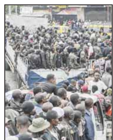
M23 rebels escort government soldiers and police who surrendered to an undisclosed location in Goma, Democratic republic of the Congo on Jan 30.

The rebellion has killed at least 2,000 people in and around Goma and