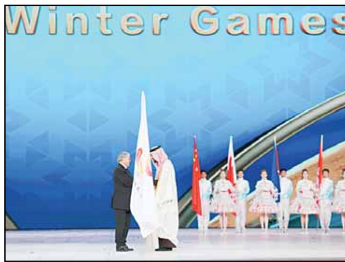
The Olympic Council of Asia (OCA) flag handover ceremony is seen during the closing ceremony of the 9th Asian Winter Games in Harbin, northeast China's Heilongjiang Province, Feb. 14, 2025.

Prince Abdulaziz Al-Faisal emphasized that the Kingdom of Saudi Arabia is undergoing