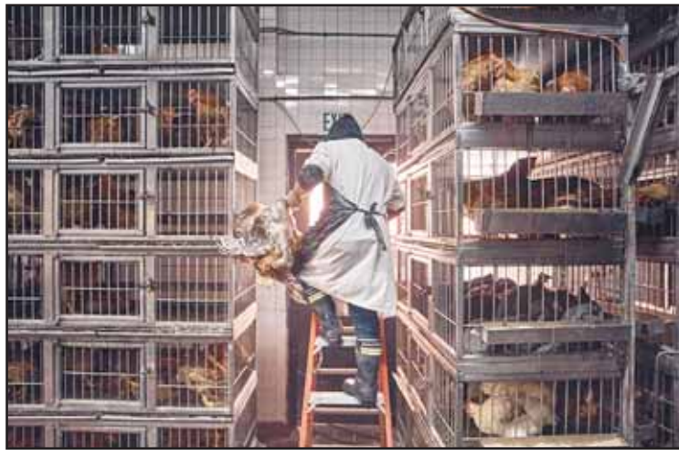
A worker grabs a chicken to slaughter inside a poultry store in New York, Feb. 7, 2025.

"This means that people are being infected, likely due to their occupational exposures, and not developing signs of illness and therefore not seeking medical care," Gray said. He said it shows that officials cannot fully understand bird flu transmission by only tracking people who go