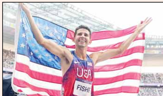
Grant Fisher, of the United States, celebrates after winning the bronze medal in the men's 5000 meters final at the 2024 Summer Olympics, Aug. 10, 2024, in Saint-Denis, France.

"In the first half we had time on the ball, and we threatened to hurt them, but we lacked that final pass," Gago said. "In the second half, we veered away from our game plan, but thankfully we were snatched a positive result."