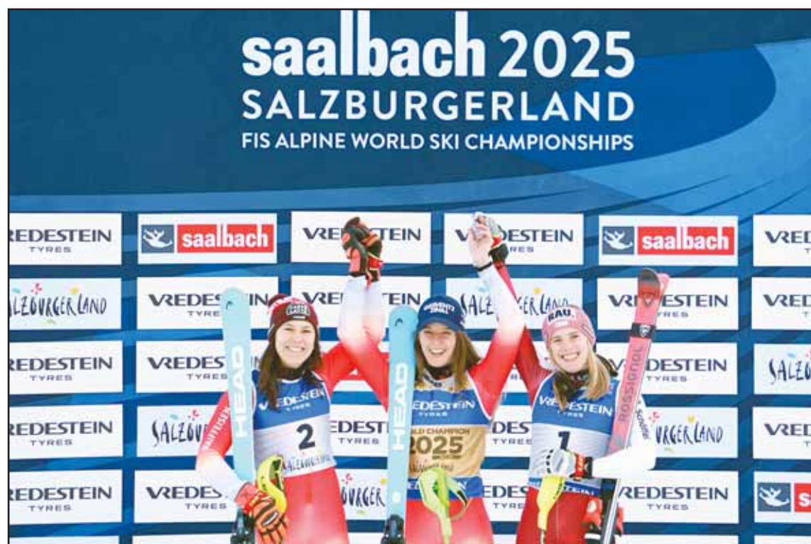
Switzerland's Camille Rast, center, winner of a gold medal in a women's slalom, celebrates on the podium with silver medalist Switzerland's Wendy Holdener, left, and bronze medalist Austria's Katharina Liensberger, at the Alpine Ski World Championships, in Saalbach-Hinterglemm, Austria, Saturday, Feb. 15, 2025.

Katharina Liensberger was 1.32 seconds behind in third took bronze. The Austrian won the slalom world title in 2021.