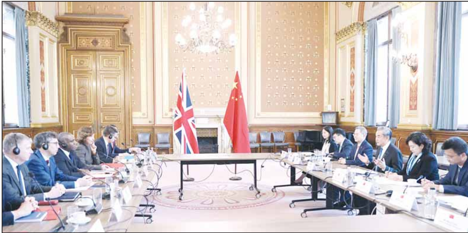
Chinese Foreign Minister Wang Yi, also a member of the Political Bureau of the Communist Party of China Central Committee, co-chairs the 10th China-UK Strategic Dialogue with British Foreign Secretary David Lammy, in London, Britain on Feb 13.