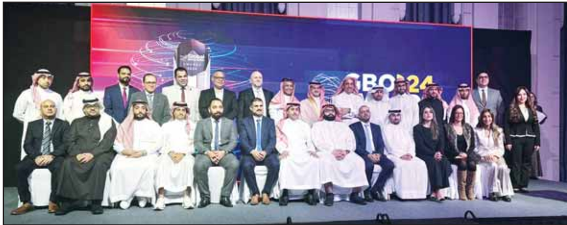
Group photo of the winning companies at the awards ceremony.

It serves to note that CODED Academy, the Middle East's first coding academy, is based in Kuwait and offers instruction in fundamental coding languages and technologies using cutting-edge tools and resources.