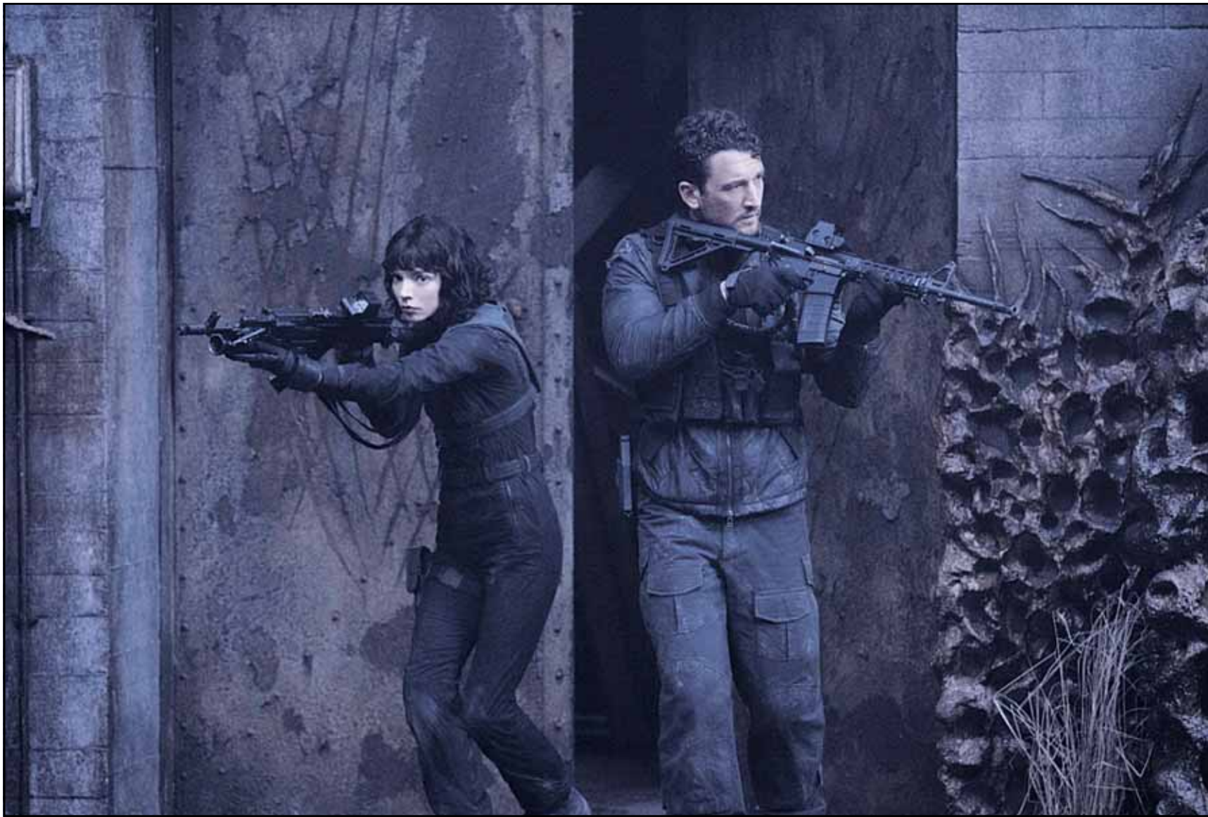
This image released by Apple TV+ shows Miles Teller, (right), and Anya Taylor-Joy in a scene from 'The Gorge.'