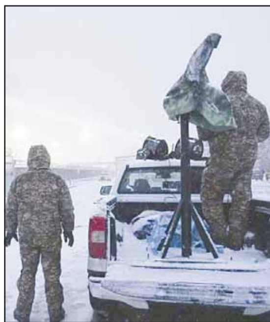
Ukrainian serviceman stands on a vehicle with anti-aircraft gun after a drone attack at the former Chernobyl nuclear power plant, Ukraine on Feb 14.

EU Commission President Ursula von der Leyen, whose services drafted some of the measures for consideration, welcomed their prospective adoption by the 27-nation bloc's ambassadors.