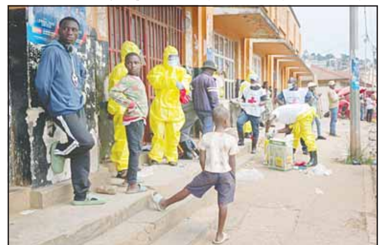
Red Cross workers gather the remains of a dead person in east Congo's second-largest city, Bukavu, one day after it was taken by M23 rebels on Feb 17.

The M23 rebels on Tuesday attacked all the main Congolese army positions on the road to Butembo, a city of 150,000 people, and the situation was rapidly deteriorating, said Auguste Kombi, a civil society leader in Kitsombo, a town along the road.