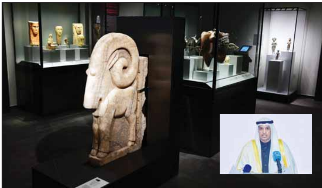
Photo shows some of the 104 rare pre-Islamic items featured in the exhibition. Inset: His Highness the Prime Minister Sheikh Ahmad Abdullah Al-Ahmad Al-Sabah's representative Minister of Information Abdulrahman Al-Mutairi speaking at the exhibition.