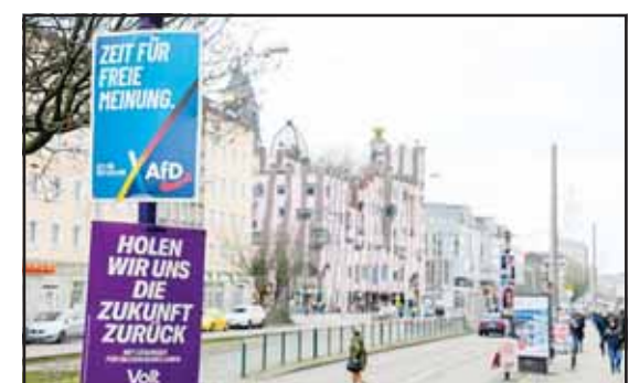
An election poster of the far-right anti-immigrant party Alternative For Germany party AfD, with the slogan reading "It's time for free opinion", is displayed in a street, in Magdeburg, Germany on Feb 7.

"We are the same as you," Gebregeregish said earlier this month. "We are not different. Just like you, we have feelings. Sometimes we are sad, sometimes we are happy, just like everyone else." The Christmas market violence was one of five high-profile attacks committed by immigrants in the past nine months that have made migration a key issue as the country heads toward an early election on Sunday. The suspect, a Saudi doctor, drove into the holiday market teeming with shoppers and left five women and a 9-year-old boy dead and 200 people injured.