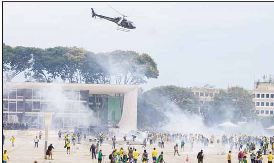
Supporters of Brazil's former president Jair Bolsonaro clash with police as they storm the Planalto presidential palace, the official workplace of the president, in Brasilia, Brazil on Jan 8, 2023.