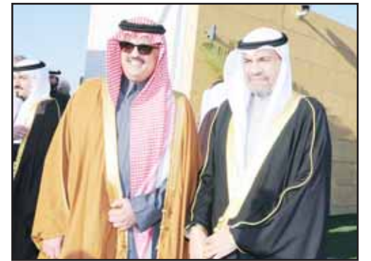
Left: Editor-in-Chief of Arab Times and Al-Seyassah newspapers Ahmed Al-Jarallah with Ambassador of the Custodian of the Two Holy Mosques to Kuwait. Right: Ambassador of the Custodian of the Two Holy Mosques to Kuwait with Foreign Affairs Minister Abdullah Al-Yahya.