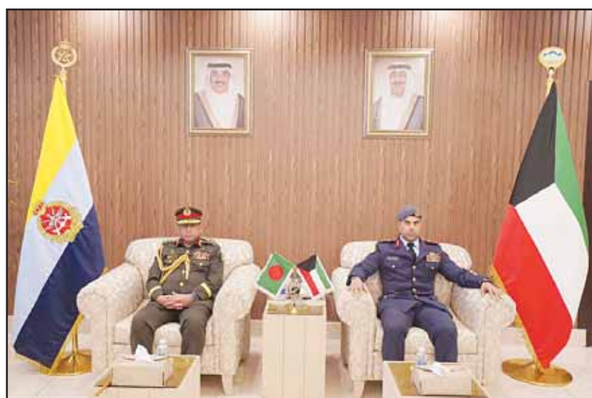
Deputy Chief of General Staff of the Kuwaiti Army receives the Bangladesh Chief of Staff to discuss joint military issues.

Road maintenance needs to be completed quickly, as traffic is becoming increasingly congested. This indicates that the roads are no longer sufficient to handle the volume of traffic. Kuwait's roads were initially designed to accommodate 700,000 cars, but today we have over three million cars. Hurry up and find solutions in order to avoid spending our lives stuck in traffic.