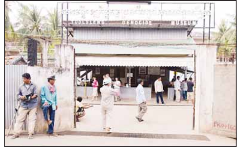
The front gate of Tuol Sleng genocide museum in Phnom Penh, Cambodia, on Nov 13, 2007.

Critics charged that the measure then was a veiled attempt to undermine his political opponents and allege that the latest proposed legal change has a similar motive.