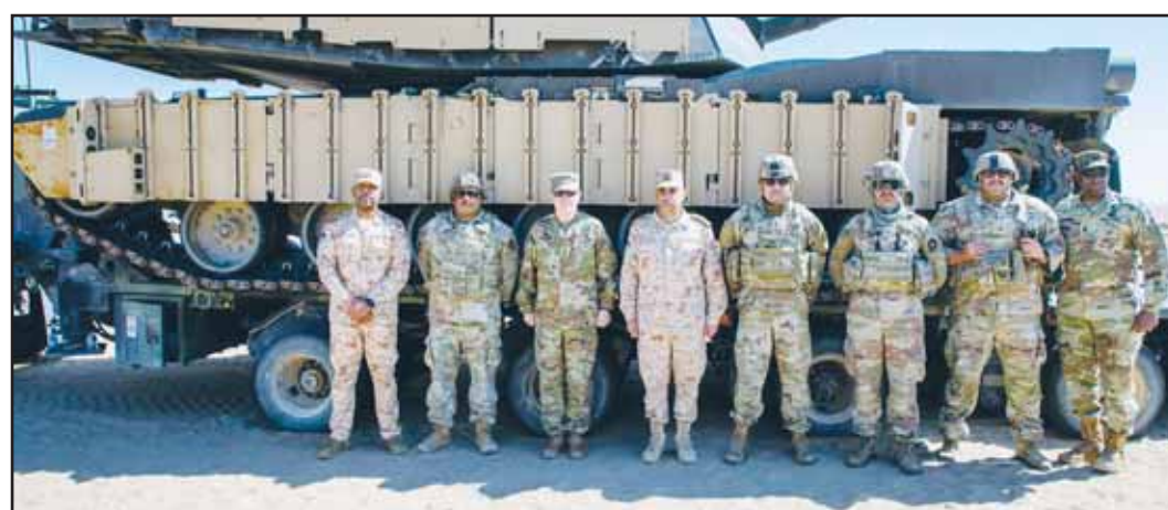
Commander of the Land Forces and Commander of United States Army in a group photo during a tour inspection.