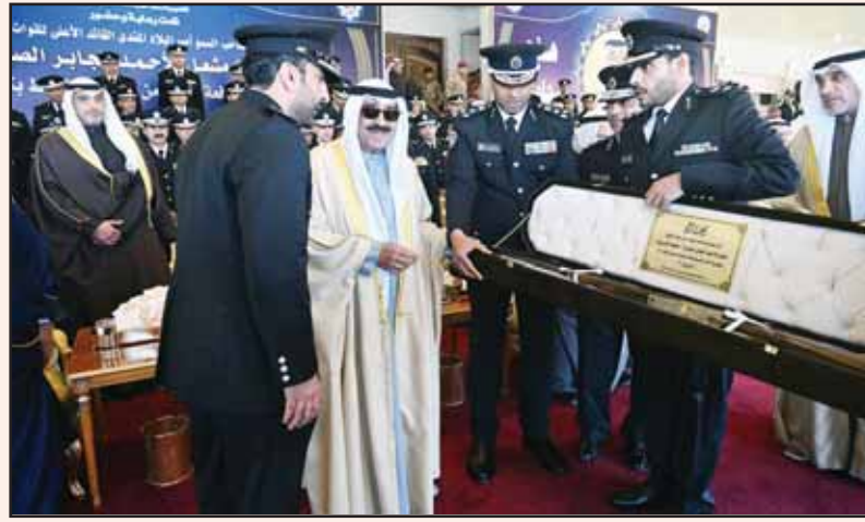
Left: His Highness the Amir attends the graduation ceremony of the 47th batch of cadets at the Police Academy. Right: HH the Amir presented with the Academy's shield.