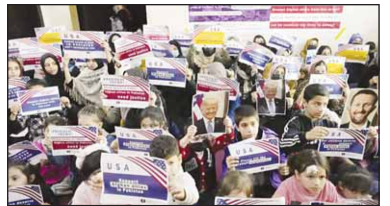
Afghan refugees hold placards during their meeting to discuss situation after President Donald Trump paused the U.S. refugee programs, in Islamabad, Pakistan on Jan 24.

In a strongly worded statement on Wednesday, the Afghan Embassy -