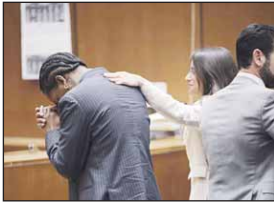
A$AP Rocky reacts in the courtroom after he was found not guilty during his trial Tuesday, Feb 18 in Los Angeles.

In the same city as his acquittal, he is set to bask in the height of hip-hop as headliner of the Rolling Loud music festival next month. On the other coast, he'll be at the height of fashion's biggest night, the Met Gala, as a celebrity co-chair along with LeBron James and Pharrell Williams in May. And in summer, he adds major motion picture actor to his resume as the co-star - with Denzel Washington - in director Spike Lee's film "Highest 2 Lowest."