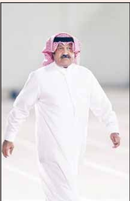
Sheikh Ahmed Al-Yousef Al-Sabah

KUWAIT CITY, Feb 19: Sheikh Ahmed Al-Yousef Al-Sabah, Chairman of the Kuwait Football Association, expressed his appreciation for the efforts of all relevant authorities in preparing to host the Gulf Cup for Veterans, set to take place in Kuwait from February 22 to 26.