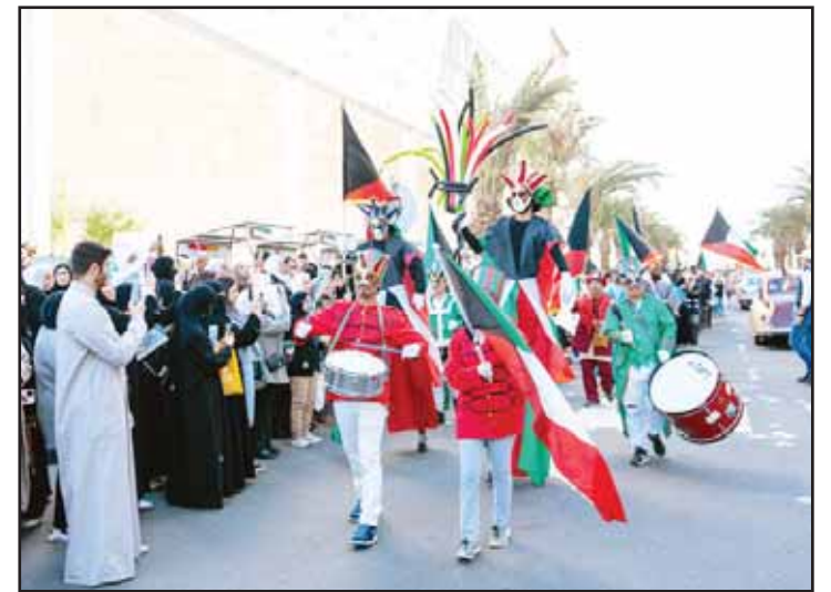
A musical band by students.