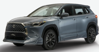
TOYOTA COROLLA CROSS (MY 2024)