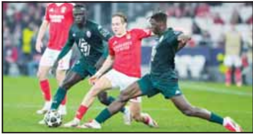
Benfica's Andreas Schjelderup, center, duels for the ball with Monaco's Krepin Diatta, front left, and Monaco's Wilfried Singo during a Champions League playoff second leg soccer match between SL Benfica and AS Monaco at the Luz stadium in Lisbon. Benfica won 4-3 on aggregate. — See Page 15