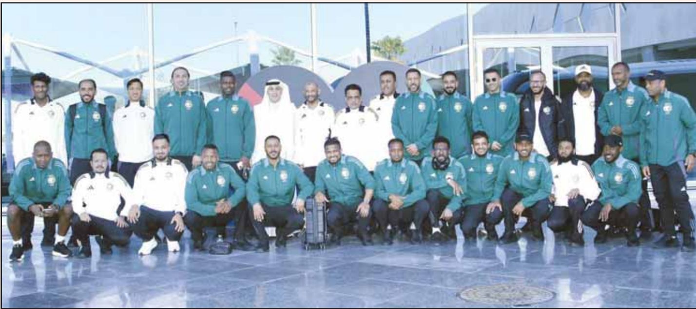
Saudi team arrives for the championship.