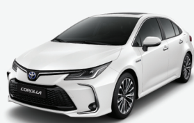
TOYOTA COROLLA (MY 2024)

VIN: RKL30EE5R0015078 TO RKLKUBAG3R0506202