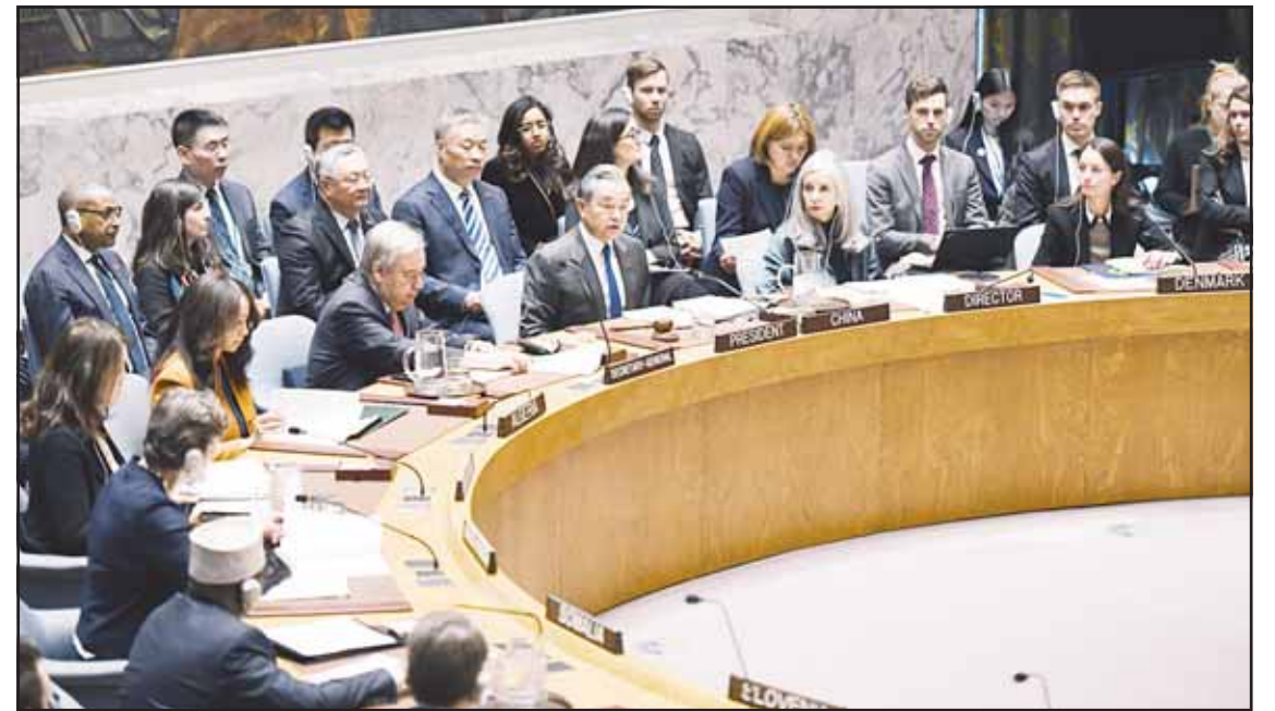
Chinese Foreign Minister Wang Yi, also a member of the Political Bureau of the Communist Party of China Central Committee, chairs the UN Security Council's high-level meeting on 'Practicing multilateralism, reforming and improving global governance' at the UN headquarters in New York on Feb 18.