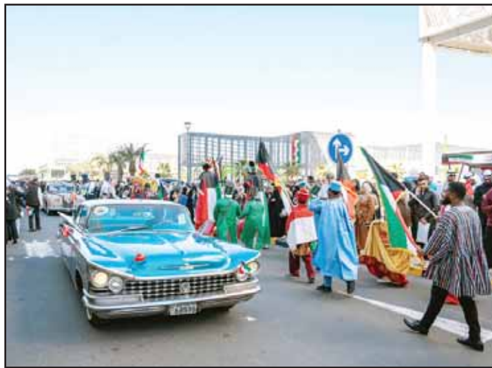
Vintage cars on display.