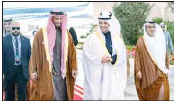
Minister of Information and Culture and Minister of State for Youth Affairs Abdulrahman Al-Mutairi during his reception of the Chairman of the UAE National Media Office, Sheikh Abdullah Al-Hamed.