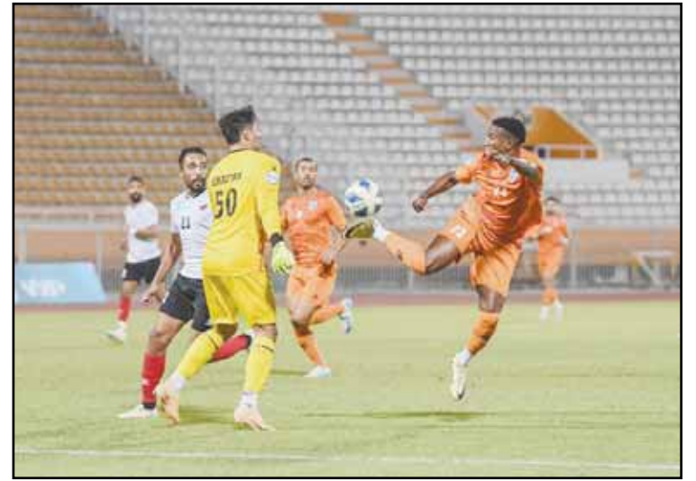
Players fighting for the ball during Zain Premier League match.

Clubs placed seventh to tenth will battle in the relegation avoidance league, a single-round competition where two teams will be relegated to the first division, while the other two will retain their spots among the "big six" for the next season.