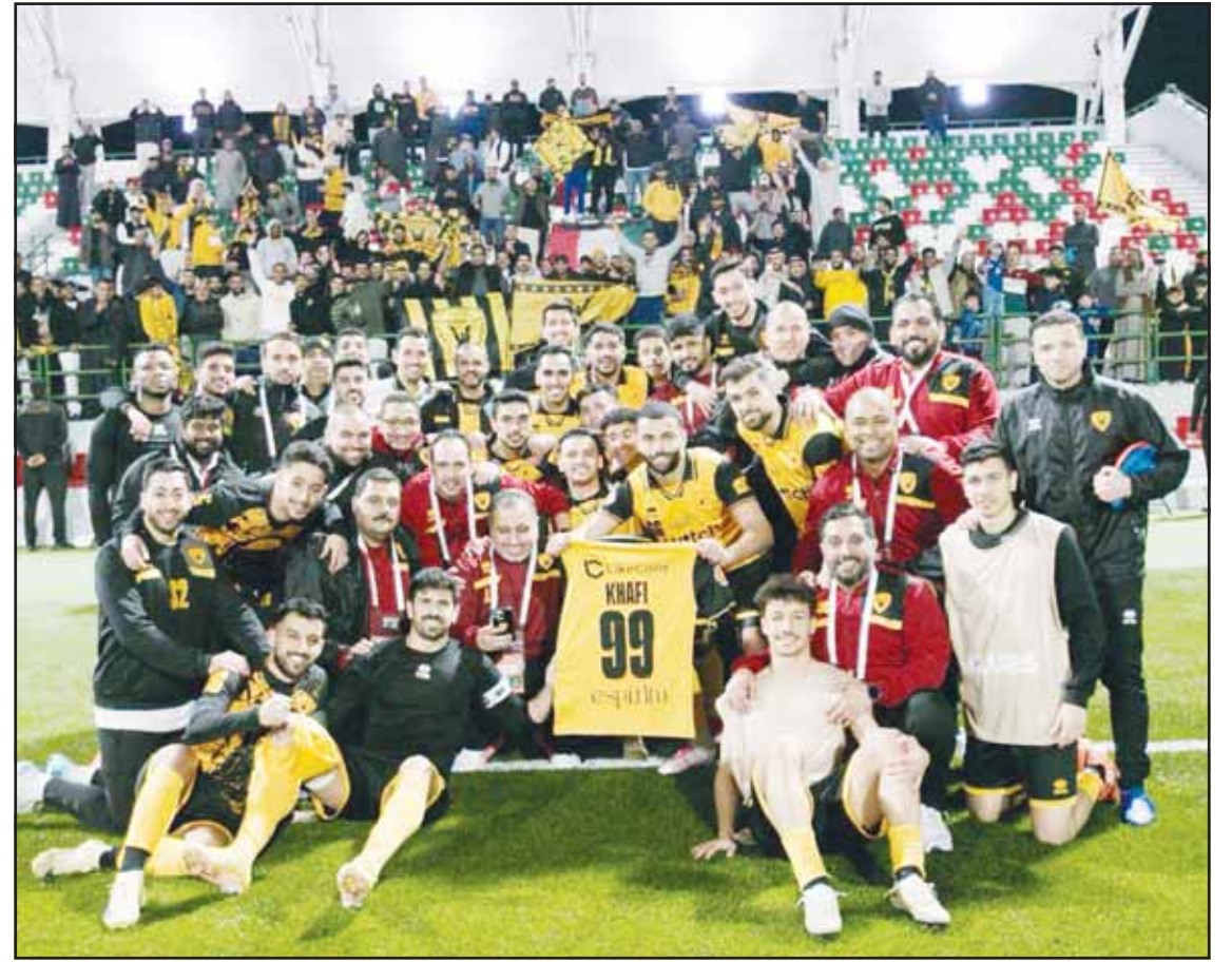
Al Qadsiya players celebrate after their qualification.

With a potential final showdown against Al-Ettifaq on the horizon, Al-Qadsiya will now focus on their upcoming challenge against Al-Nasr, aiming to continue their strong campaign in the tournament.