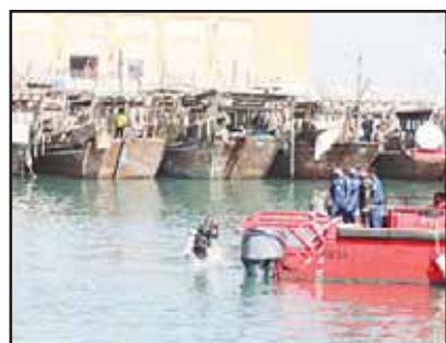
Marine rescue teams in action.

Several senior officers attended the meeting from both sides, and an official reception ceremony was held to welcome the visiting delegation.