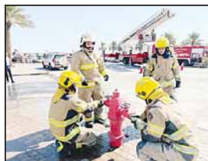
Fire-fighters connecting a hose to the hydrant.