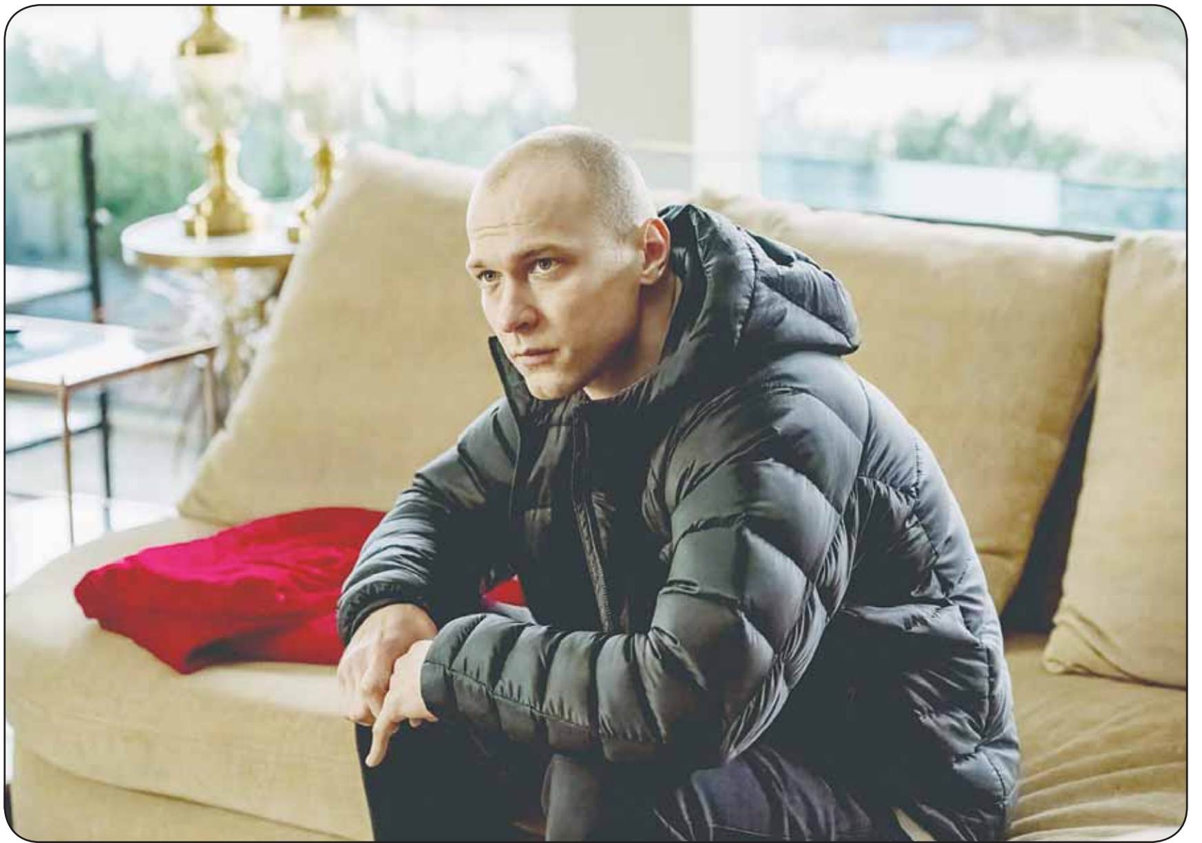
This image released by Neon shows Yura Borisov in a scene from 'Anora.' (AP)