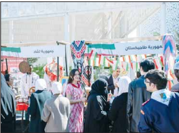
Stalls set up by foreign students.