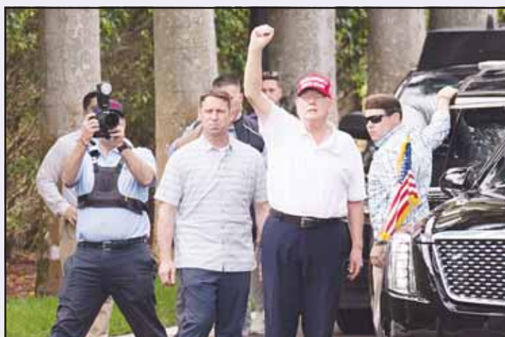
US President Donald Trump gestures to supporters gathered for a Presidents' Day rally as he leaves the Trump International Golf Club on Feb 17, in West Palm Beach, Fla.