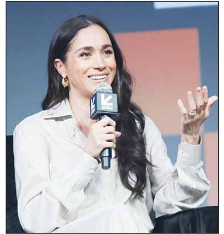
Meghan, The Duchess of Sussex, speaks during South by Southwest Conference in Austin, Texas, on March 8, 2024.

"Of course there will be fruit preserves," she said. "I think we're all clear at this point that jam is my jam. But there are so many more products that I just love that I use in my home. And now it's time to share with you."