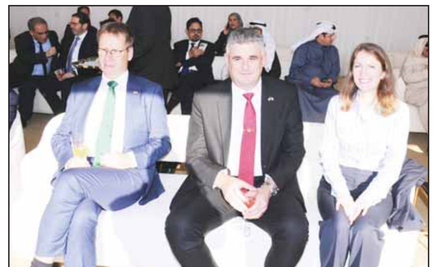
Some photos of sheikhs, governors, citizens and heads of diplomatic missions who attended the event.