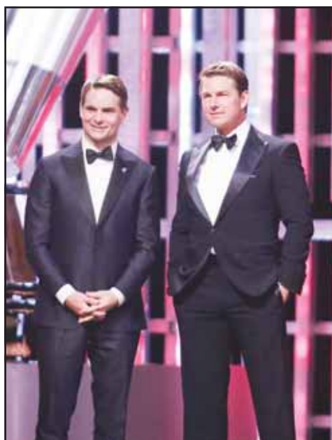
Jeff Gordon, (left), and Tom Cruise listen on stage during the NASCAR Sprint Cup Series auto racing awards, Dec. 4, 2015, in Las Vegas.

"I am seeing just a lot more momentum in projects like coming through NASCAR and coming to Hendrick Motorsports and just more interest," he said. "So that's good, right? It talks a lot about where the sport is at, where it's heading, the amazing crowd that was here all weekend, not just today, new TV partners."