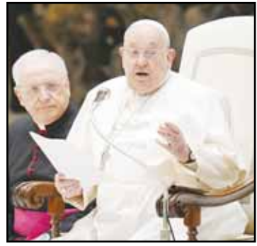
Pope Francis starts reading his speech during his weekly general audience in the Paul VI Hall, at the Vatican, Wednesday, Feb. 12, 2025.

Francis was admitted to the Gemelli hospital Friday after a weeklong bout of bronchitis worsened. On Monday, medical personnel determined that he was suffering from a polymicrobial respiratory tract infection, meaning a mix of viruses, bacteria and possibly other organisms had colonized in his respiratory tract. Late Tuesday, the Vatican said a chest CT scan showed