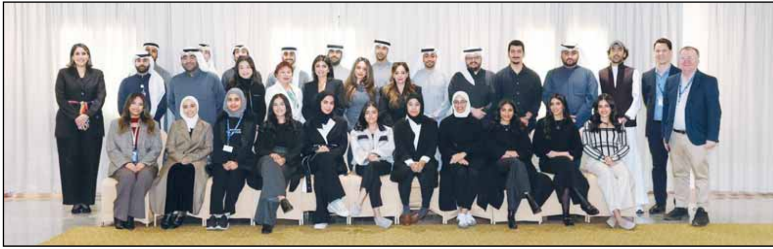
Group photo of the program participants.

TechEdge program equips youth with AI, data science & cybersecurity skills