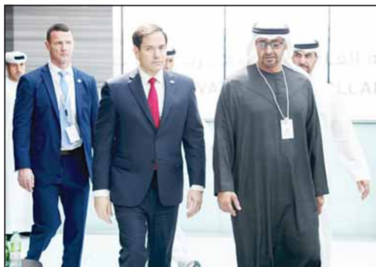
US Secretary of State Marco Rubio, (center), walks with United Arab Emirates President Sheikh Mohamed bin Zayed Al Nahyan as they meet at ADNEC Centre Abu Dhabi in Abu Dhabi, United Arab Emirates on Feb 19.

Both the UAE and Saudi Arabia have been discussed as possible sites for peace talks to end the war in