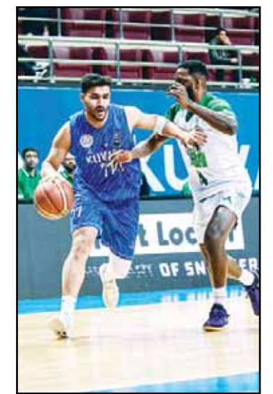
Kuwaiti player drives past an opponent during the friendly match between Kuwait and Saudi Arabia.

In the first match, Kuwait triumphed over Saudi Arabia with a 79-75.