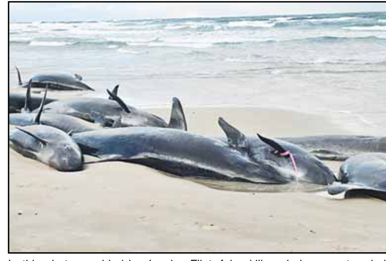
false killer whales are stranded, Wednesday, Feb. 19, 2025, on a remote beach near Arthur River in Australia's island state of Tasmania.

Scientists suspect that the first person infected in an Ebola outbreak acquires the virus through contact with an infected animal or eating its raw meat. Ebola was discovered in 1976 in two simultaneous outbreaks in South Sudan and Congo, where it occurred in a village near the Ebola River, after which the disease is named.