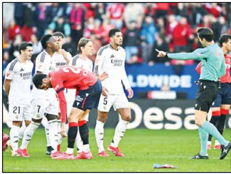
Real Madrid's Jude Bellingham, centre, protests to the referee after being shown a red card during a Spanish La Liga soccer match between Osasuna and Real Madrid at El Sardar stadium in Pamplona, Spain.

That means he will be unavailable for league games against Girona and Real Betis.