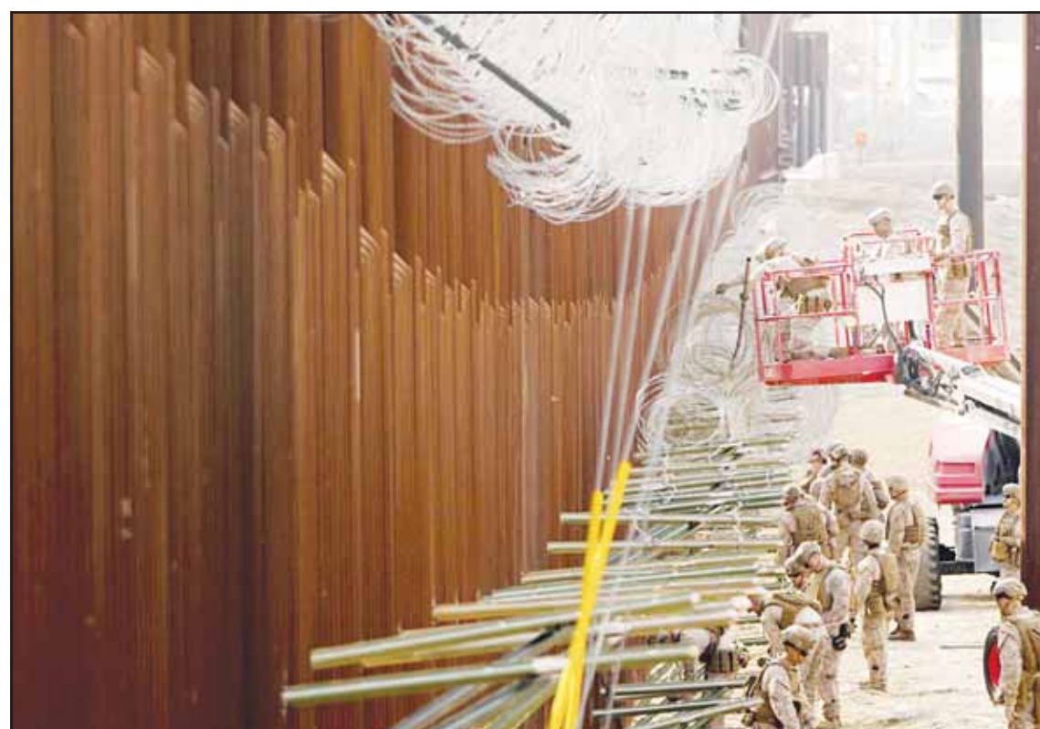
US Marines install barbed wire along the border fence on Jan 31, in San Diego.