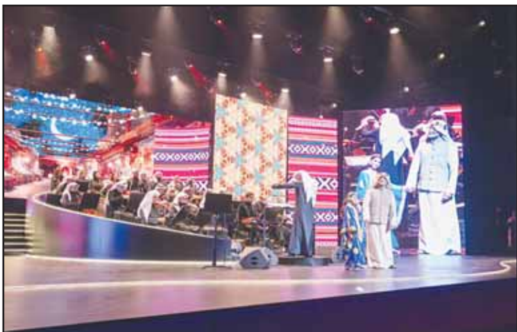
The ceremony witnessed distinctive musical and singing segments.