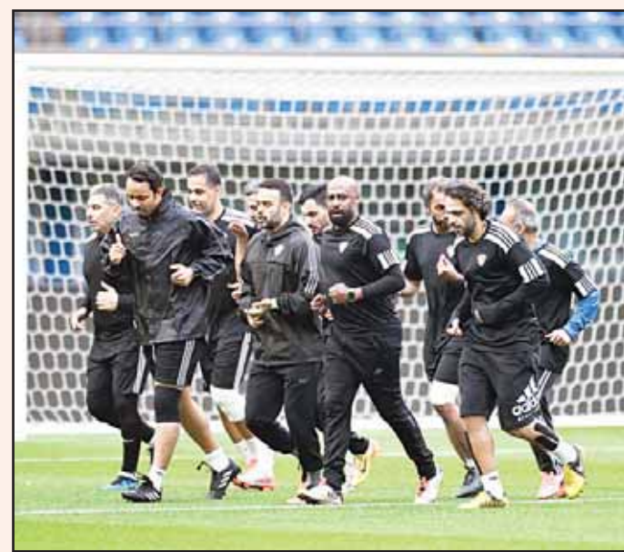
Kuwait veterans hold their final training session for the championship.