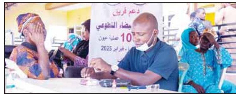
The White Hands Volunteer Project is one of the association's projects.

The contest categories are Best Kuwaiti novel, Best Kuwaiti collection of poetry, best theatrical text, Best children's story, Best short story, and the Best critical article dealing with a Kuwaiti literary work. Established in 1964, Kuwait Writers Association consisted of poets, story writers, and novelists, and aims to foster the intellectual movement and literary renaissance in Kuwait and the trend in literature to serve the Arab community and to develop national and patriotic awareness.