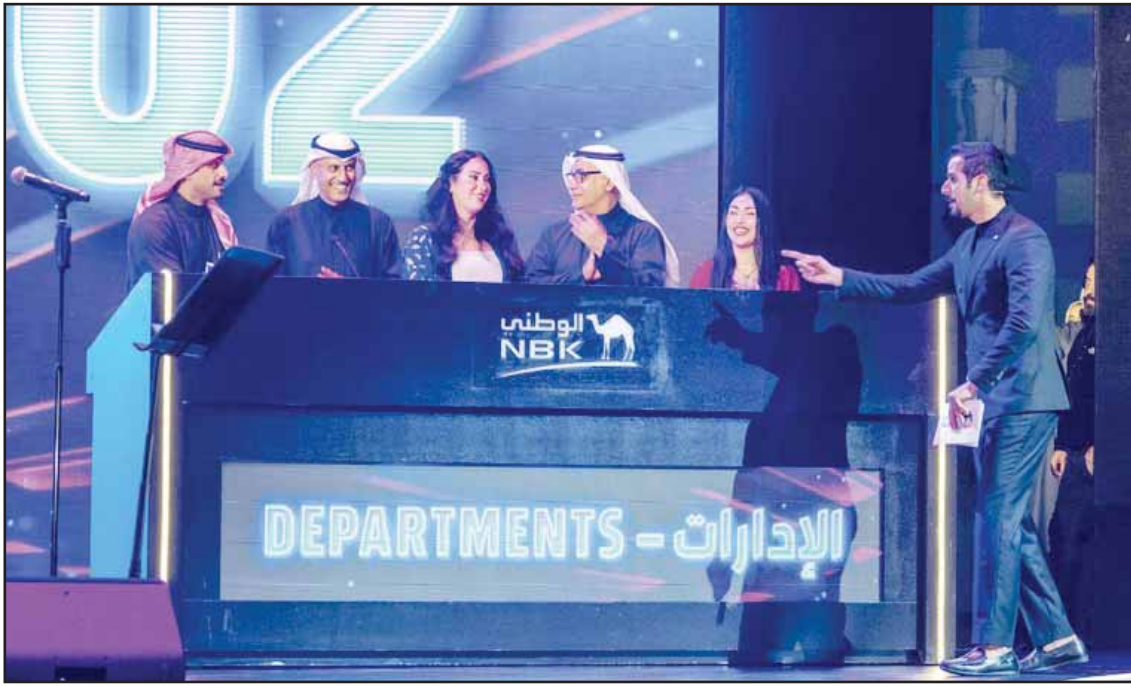
Part of the executive management's participation in one of the competitions during the ceremony.