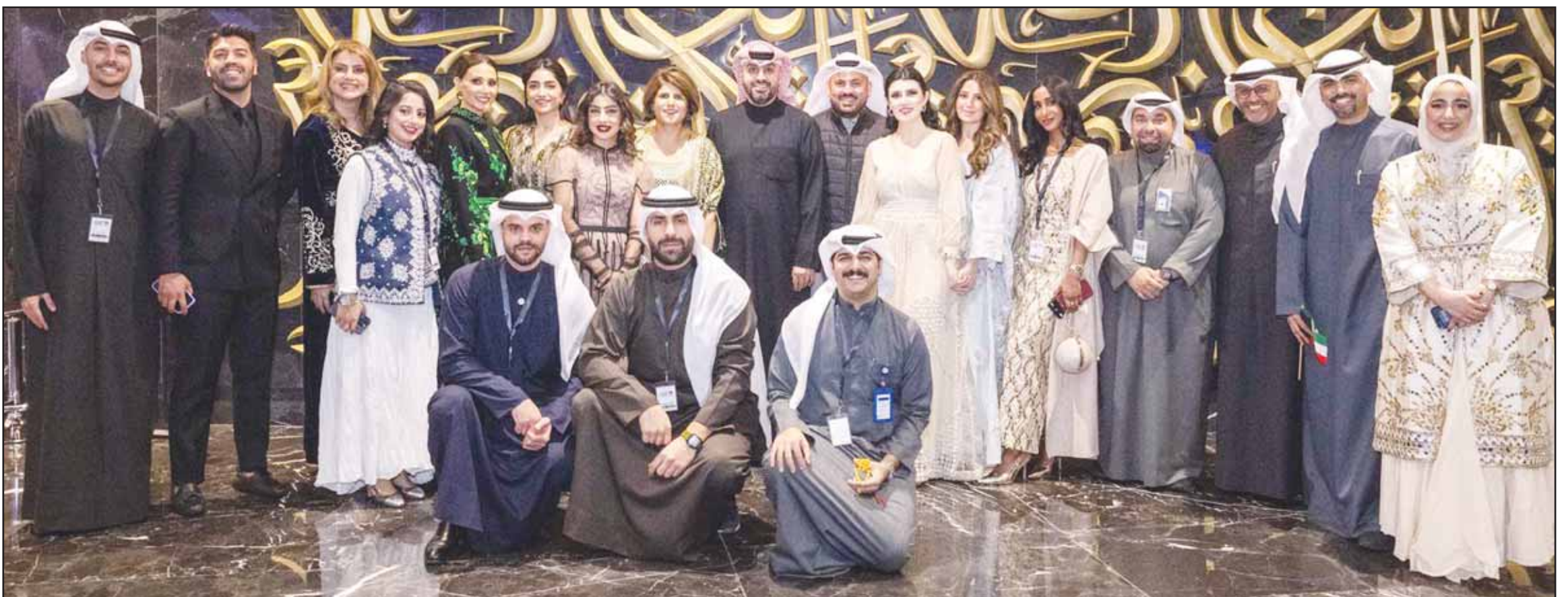
National Bank of Kuwait employees in a group photo.