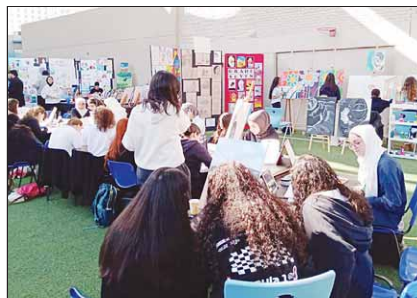
Students engaged in the Exhibition.