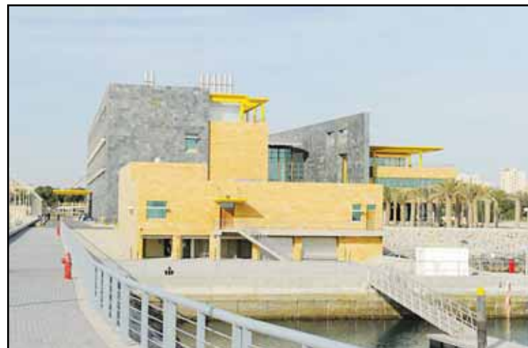
Marine Science Center, Al-Fintas, Kuwait