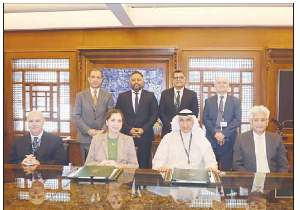
MoU signed to advance data-driven decision-making in Arab region.