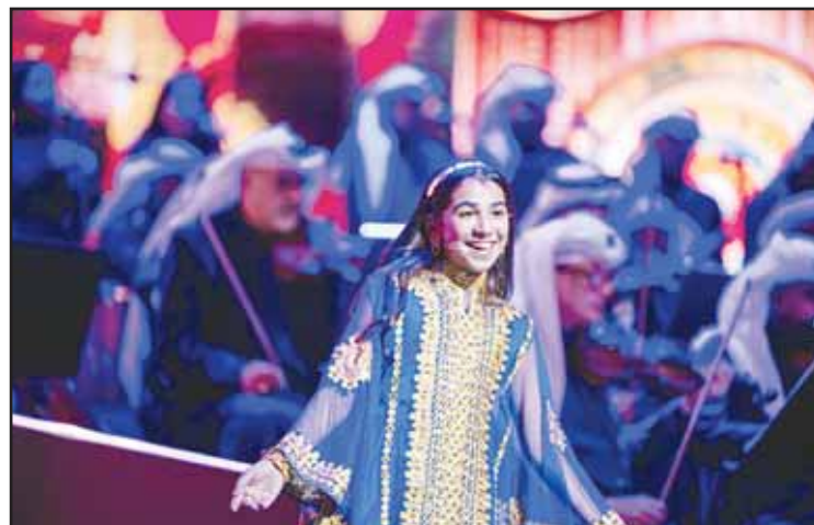
Part of the party activities.