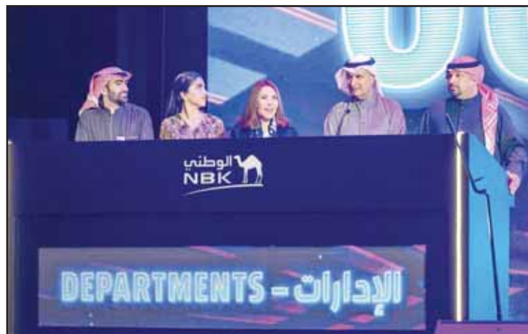
Executive management participates in competitions during the ceremony.