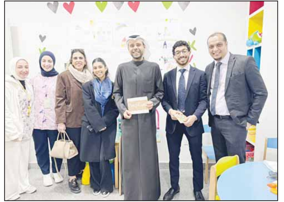
Group photo of Invest GB team.