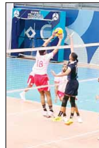
Players battling for the ball during the volleyball league.

Al-Qadisiya and Al-Arabi both have six points from three and four matches, respectively,