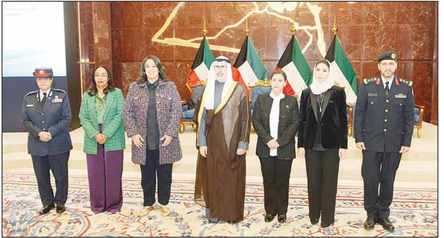
Group photo of the forum participants with Deputy Foreign Minister Ambassador Sheikh Jarrah Jaber Al-Ahmad Al-Sabah.

Compiled by Mahmoud Attiyeh/ Simi K. Kutty