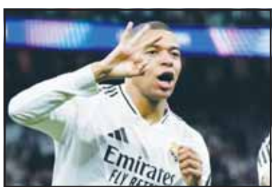
Real Madrid's Kylian Mbappé celebrates with Real Madrid's Jude Bellingham, right (unseen), after scoring his side's third goal during the Champions League playoff second leg soccer match between Real Madrid and Manchester City at the Santiago Bernabeu Stadium in Madrid, Spain.