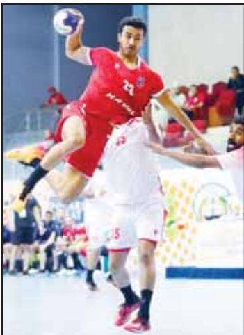
Kuwait Club player tackles an opponent during the Zain Premier League match.

Additionally, matches to determine the fifth to seventh place rankings will also take place tomorrow.