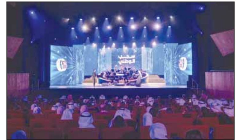
Draws and prizes.