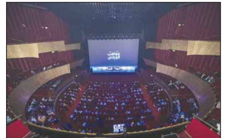
National talents added a fun atmosphere to the party.