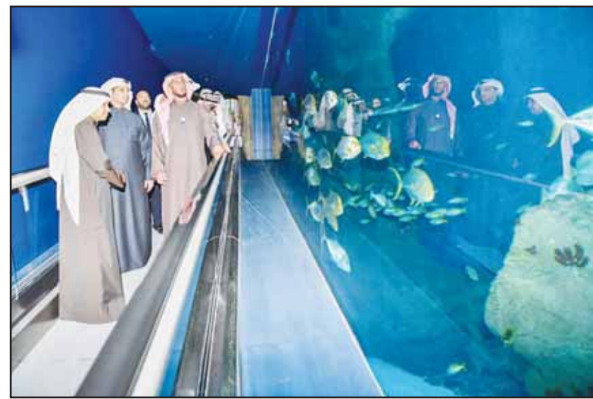
Minister of Information and Culture and Minister of State for Youth Affairs Abdulrahman Al-Mutairi and Chairman of the UAE National Media Office and Chairman of the Emirates Media Council Sheikh Abdullah Al-Hamed view the contents of the center.

The authority revealed in a press statement that the training program extended for nine weeks, with a total of 180 training hours and the participation of more than 45 employees and 13 lecturers in many fields.