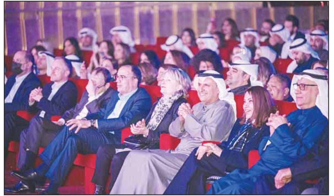
Executive management at the forefront.

Honoring their vital contribution to the bank's ongoing success