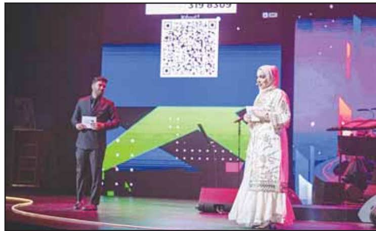
One of the party's segments.