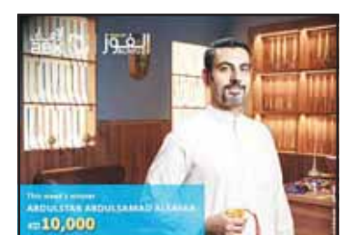
Alfouz 2025 Weekly Winner.

With a KD 100,000 quarterly draw, in addition to an exciting KD 20,000