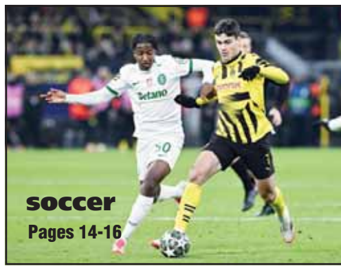
Soccer Pages 14-16