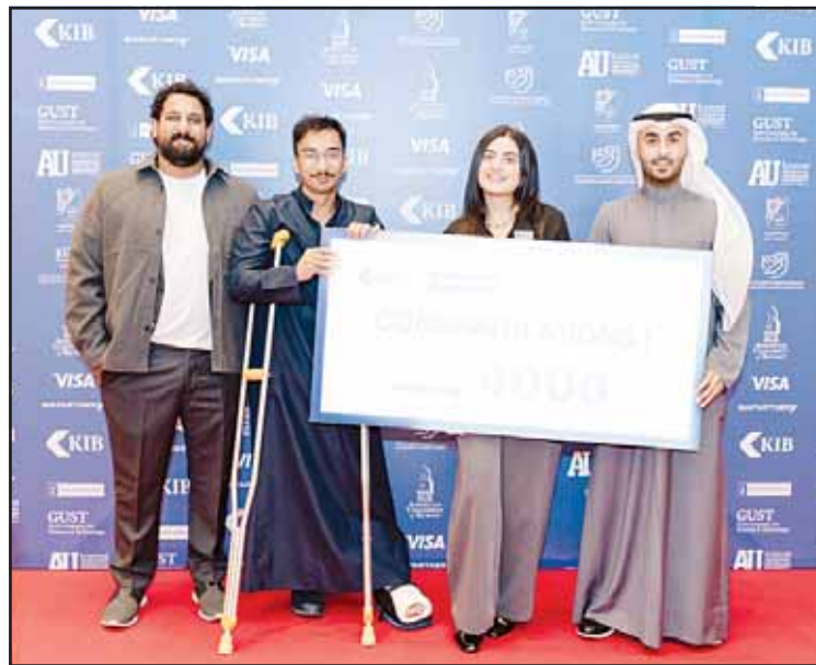
Australian University students at the H.I. Innovation Program.