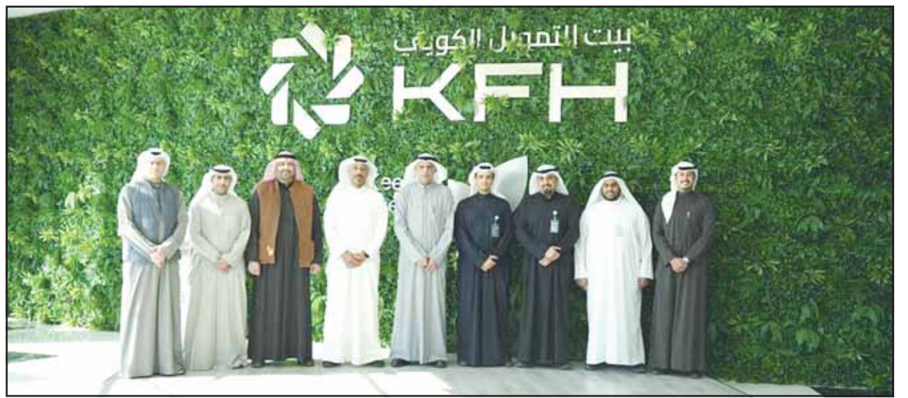
Group photo after signing the agreement.

For the first time in Kuwait and through KFHonline app