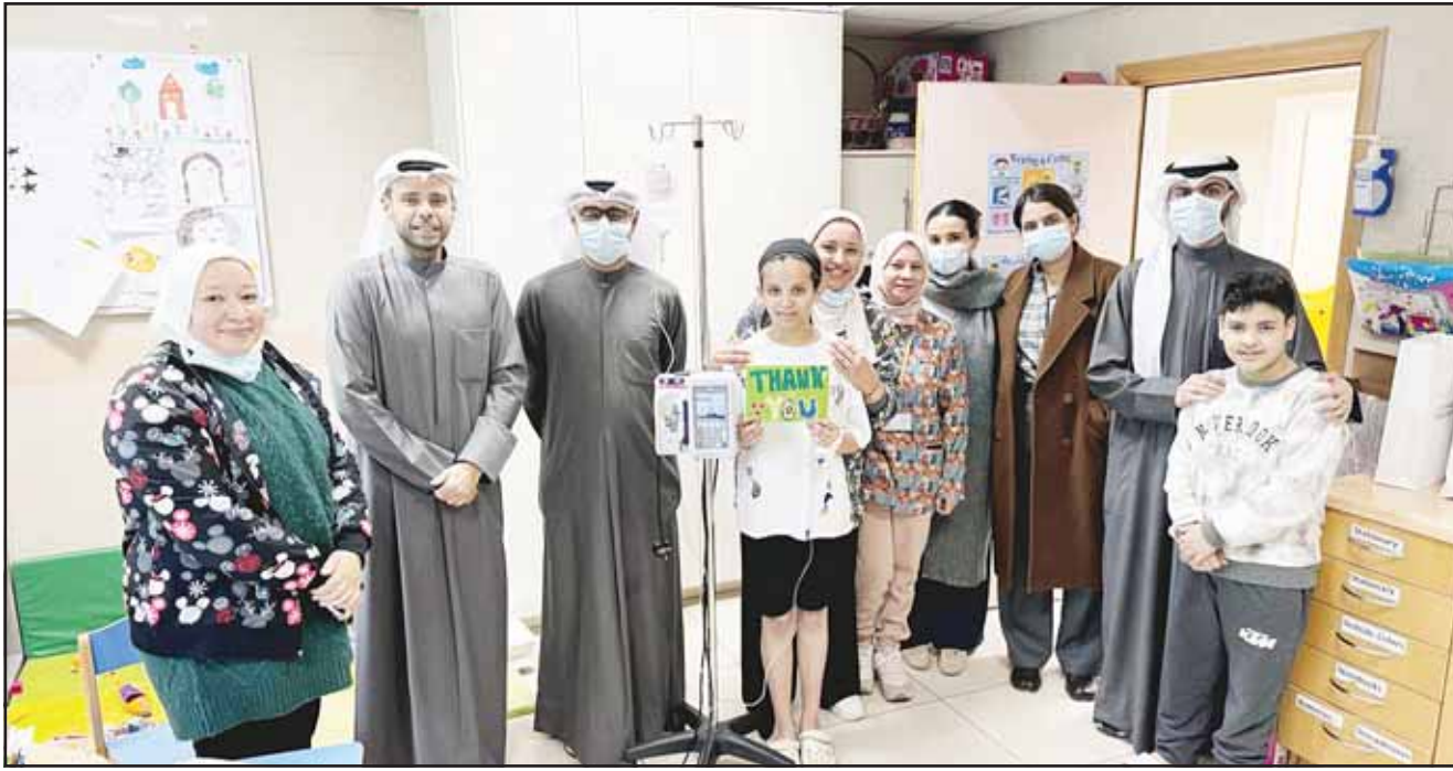
Invest GB team during the hospital visit.