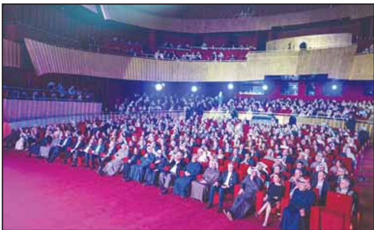
Part of the audience.

NBK places great emphasis on social and cultural initiatives that strengthen employees' sense of belonging and job satisfaction while fostering a spirit of collaboration and teamwork. By cultivating an inspiring work environment that encourages creativity and innovation, the bank ensures that these values translate into exceptional service quality, reinforcing its commitment to delivering an unparalleled banking experience to its customers.