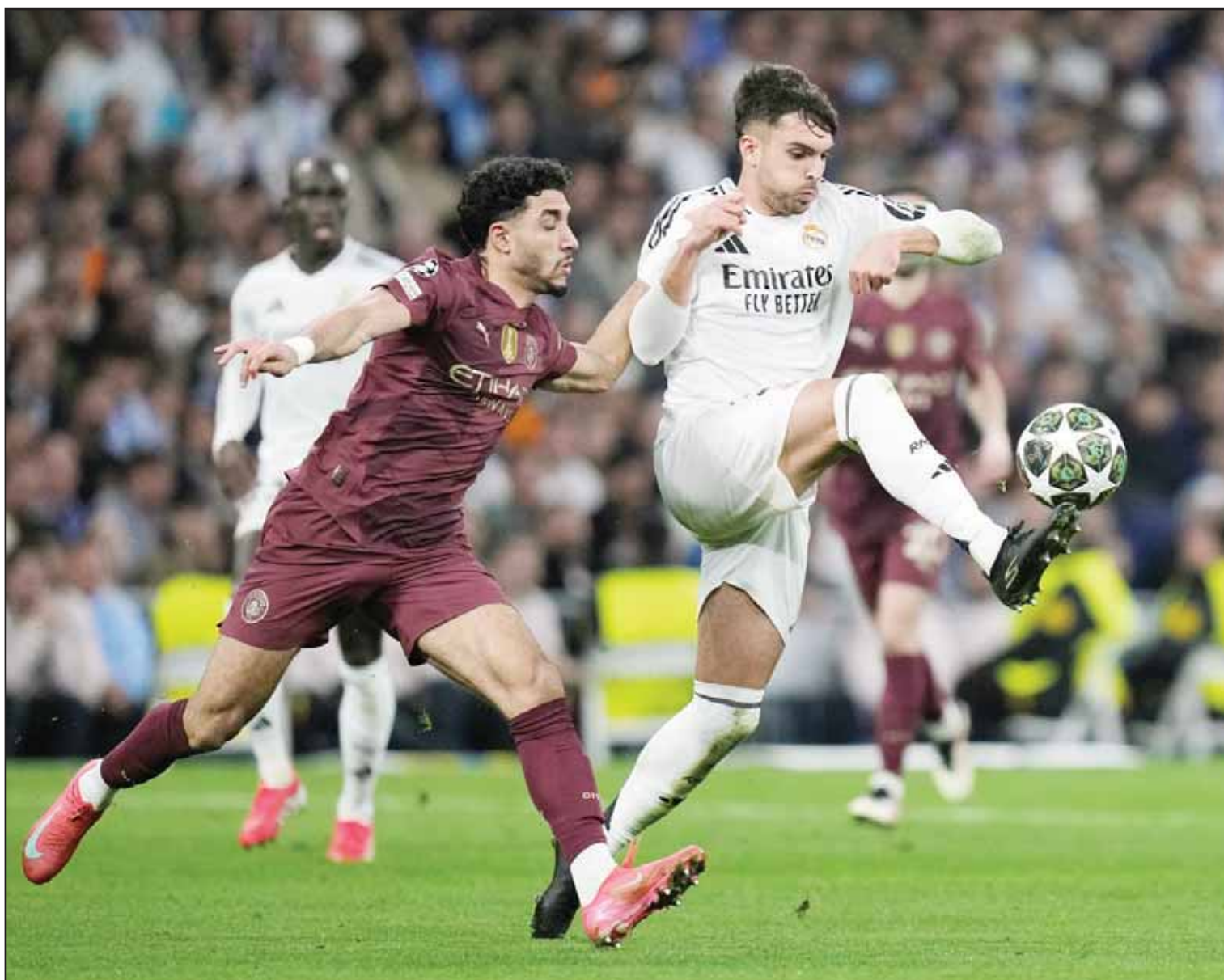
Real Madrid's Raul Asencio, right, controls the ball as Manchester City's Omar Marmoush tries to stop him during the Champions League playoff second leg soccer match between Real Madrid and Manchester City at the Santiago Bernabeu Stadium in Madrid, Spain.