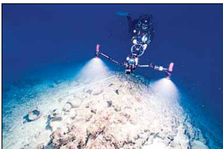
Phoenician shipwreck

aims to rejuvenate discussions about underwater archaeology in Kuwait and foster interdisciplinary connections between local and international