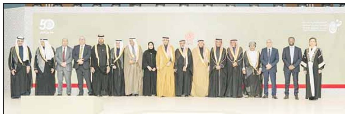
Dhaman celebrates 50th anniversary under Minister Aljadaan's patronage.

Minister Aljadaan noted in his speech that this backing offered by the Kingdom is an extension of being one of the Corporation's largest shareholders, as it spearheaded efforts