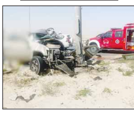
The driver of the vehicle died.

He urged the public to extend a hand of cooperation with the judicial control team by reporting violations through hotline numbers 152-153 round the clock, asserting that legal measures will be taken immediately.