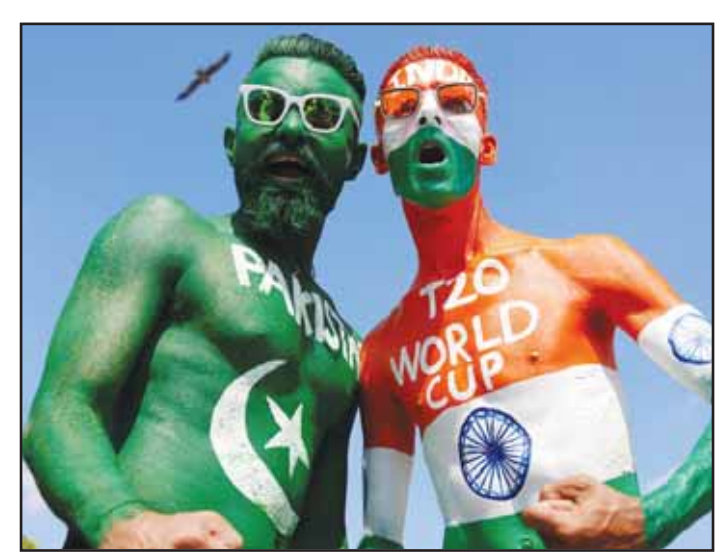
Indian cricket fans, their bodies painted in the colors of the national flags of India, right and Pakistan,left, pose for photograph in Ahmedabad, India.

That animosity largely stems from the two countries' dispute over Kashmir, a restive Himalayan region over which they have fought two wars. Nuclear-armed rivals each administer part of Kashmir, but both claim the territory in its entirety.