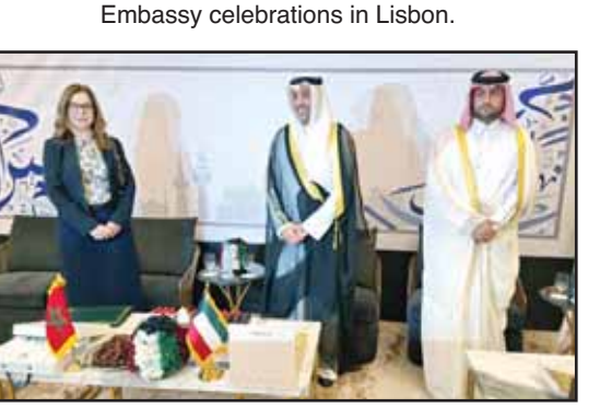
Celebrations in embassy at Rabat.

GCC country to establish diplomatic relations with Vietnam in 1976 and a key contributor to its development programs.