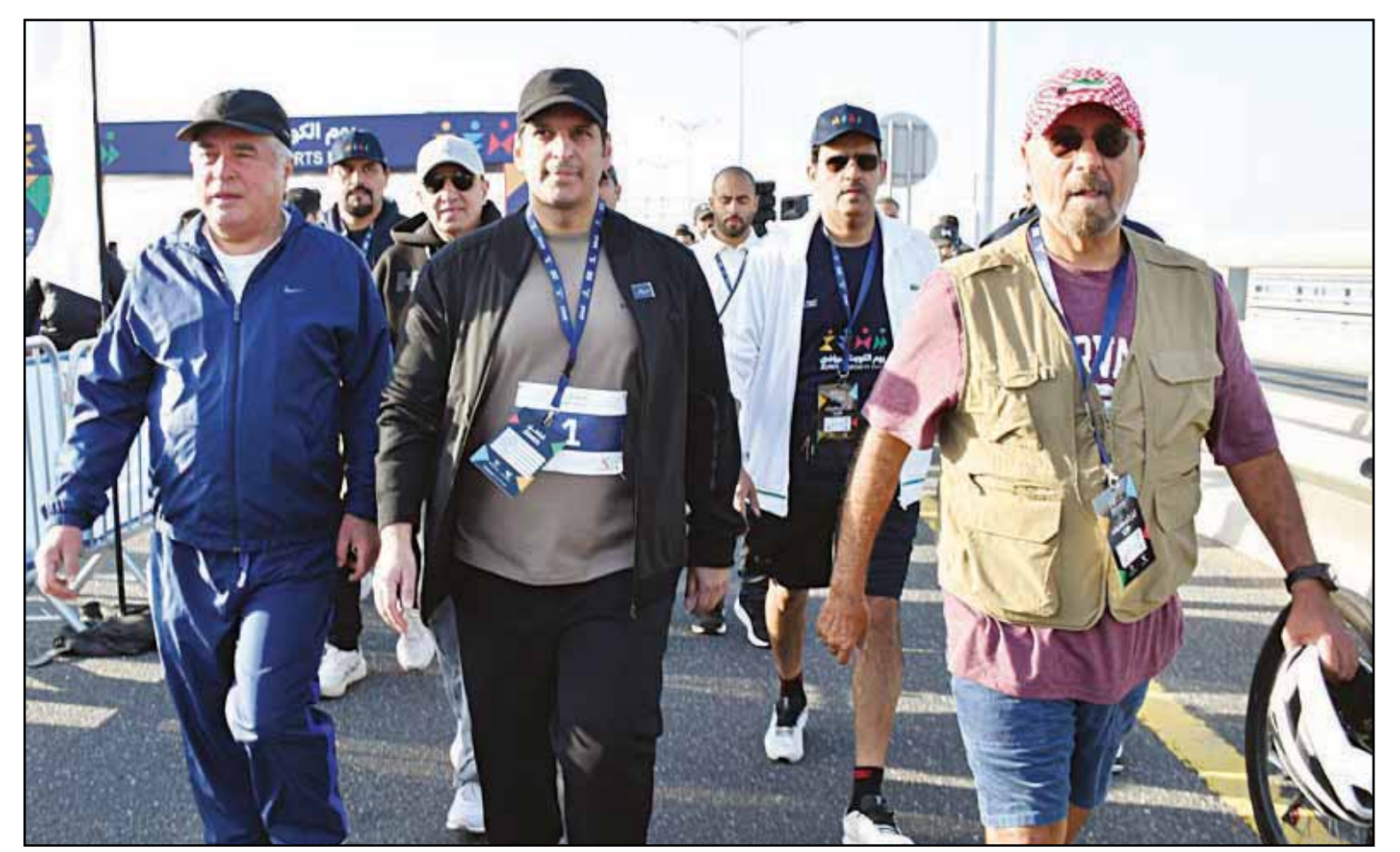
His Highness the former Prime Minister Sheikh Mohammed Sabah Al-Salem and the Minister of Information are among the participants.