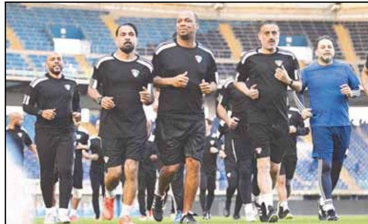
The Kuwaiti players preparing for the opening match against UAE.

At the bottom of the standings, Yarmouk remains in last place. Despite their commendable performance against Al-Arabi, they now face an uphill battle to rearrange its strategy and make a push in the remaining six matches if it is to stay in the Premier