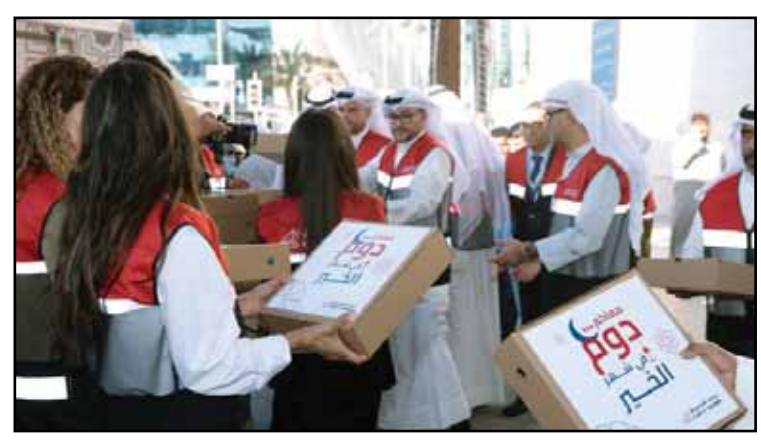
Distribution of Iftar meals.