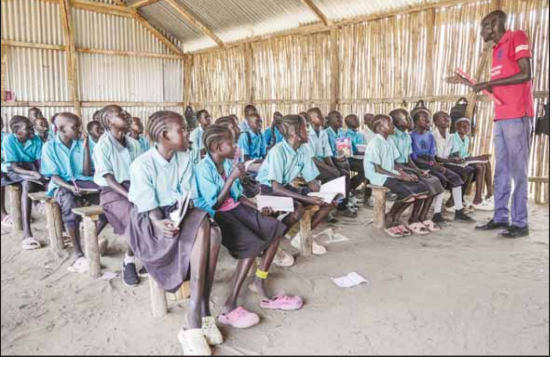
South Sudan refugee children attend a class in Juba, South Sudan on Feb 12.

Meanwhile, a teenage boy has been taken into custody after a senior man died in a fatal crash in Australia's state of Queensland on Saturday morning. Queensland police said in a statement on Saturday that the crash took place at approximately 10:40 a.m. in Kingston, a town over 20 km southeast of Brisbane, the state's capital city. A white Holden Barina and a red Ford Focus collided before the Ford Focus left the road and crashed into a mobility scooter. A 76-year-old Kingston man who was on the mobility scooter was declared deceased at the scene. A 17-year-old boy, the driver of the Ford Focus, was taken into custody at the scene. Initial investigations indicate a male and female, believed to be occupants of the Ford Focus, were observed leaving the scene on foot. The driver and sole occupant of the Holden Barina was not physically injured. Investigation into the accident is ongoing.