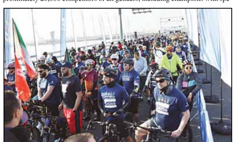
Participants preparing for action.

The number of participants in the walkathon and bicycle race reached approximately 20,000 competitors of all genders, including champions with spe-