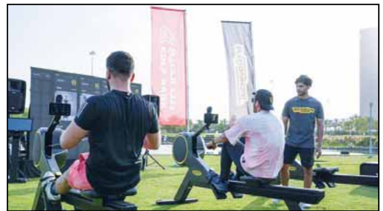
Activities that encourage exercise during Ramadan.

visit www.fourseasons.com/kuwait/ to book online.