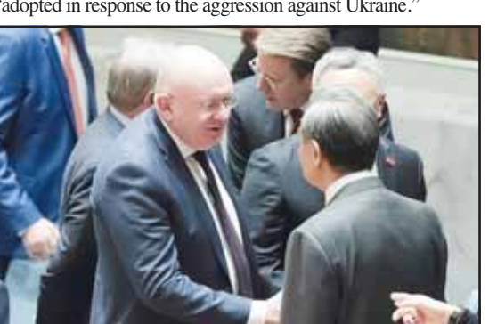
Ambassador to the United Nations Vasily Nebenzya shakes hands with China's Foreign Minister Wang Yi before a Security Council meeting on Feb 18, at the UN headquarters.

ing peace between Ukraine and Russia." By contrast, the draft resolution from the European Union and Ukraine refers to "the full-scale invasion of Ukraine by the Russian Federation" and recalls the need to implement all previous assembly resolutions "adopted in response to the aggression against Ukraine."