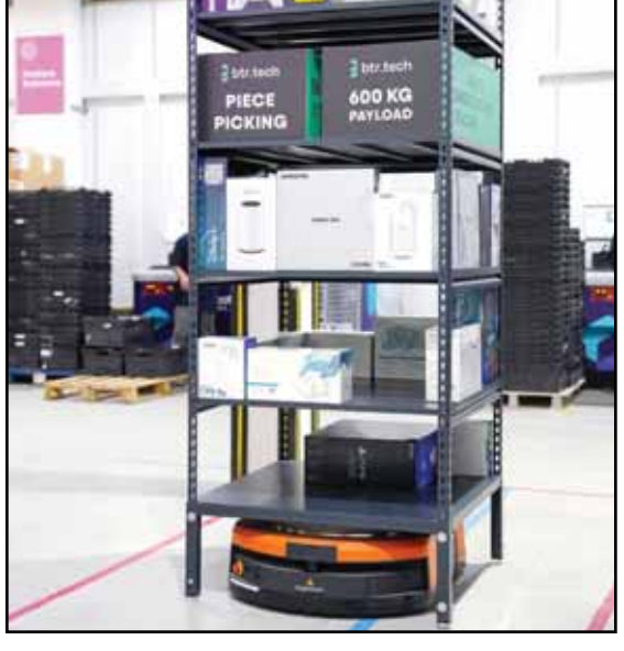
Robotics and automation solutions contribute to enriching customer experiences.

neering capabilities and expertise, Zain will, for the first time, introduce a onehour delivery service for most areas in Kuwait-a groundbreaking achievement in the country's telecom sector.