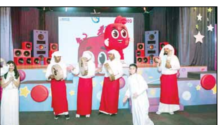
Part of last year's Gargeean celebration