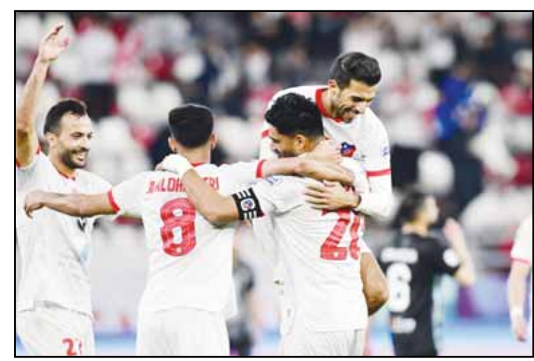
Kuwait Club players celebrate their victory over Salmiya.

Al-Arabi, however, was determined not to let its earlier setback derail its title hopes, with a late goal in the 68th minute to keep its ambitions alive for