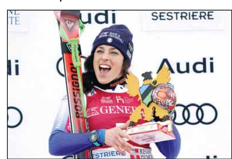
The winner Italy's Federica Brignone celebrates after an alpine ski, women's World Cup giant slalom, in Sestriere, Italy.