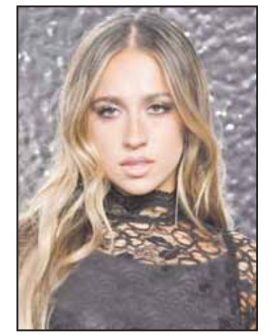
Tate McRae at the MTV Video Music Awards in Elmont, N.Y., on Sept. 11, 2024.

"Miss possessive," also the name of her upcoming tour, starts the album in force with a great choppy hook. "Re-