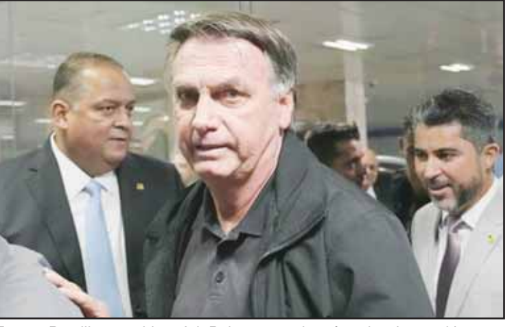
Former Brazilian president Jair Bolsonaro arrives for a luncheon with senators from his support base, at the National Congress building in Brasilia, Brazil on Feb 18.

Bolsonaro and allied lawmakers are pushing for a bill that would pardon those convicted over an insurrection on Jan. 8, 2023 - when supporters of the far-right leader stormed government buildings in Brasilia, Brazil's capital, emulating the