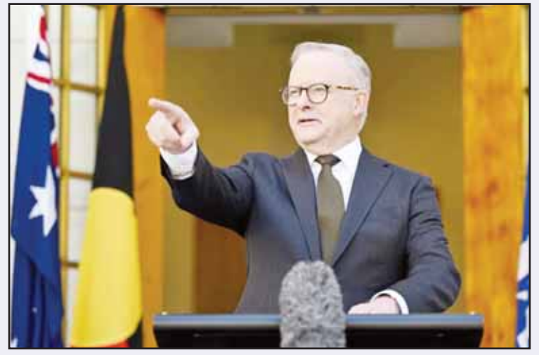
Australian Prime Minister Anthony Albanese gestures during a press conference at Parliament House in Canberra on Dec 20.

During a regular Chinese foreign ministry briefing on Friday, spokesperson Guo Jiakun said China's military had organized its fleet to conduct high seas exercises. "The drill was carried out in a safe, standard and professional manner in compliance