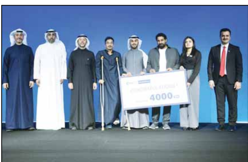
H.I. Innovation Program - Second Place Winners