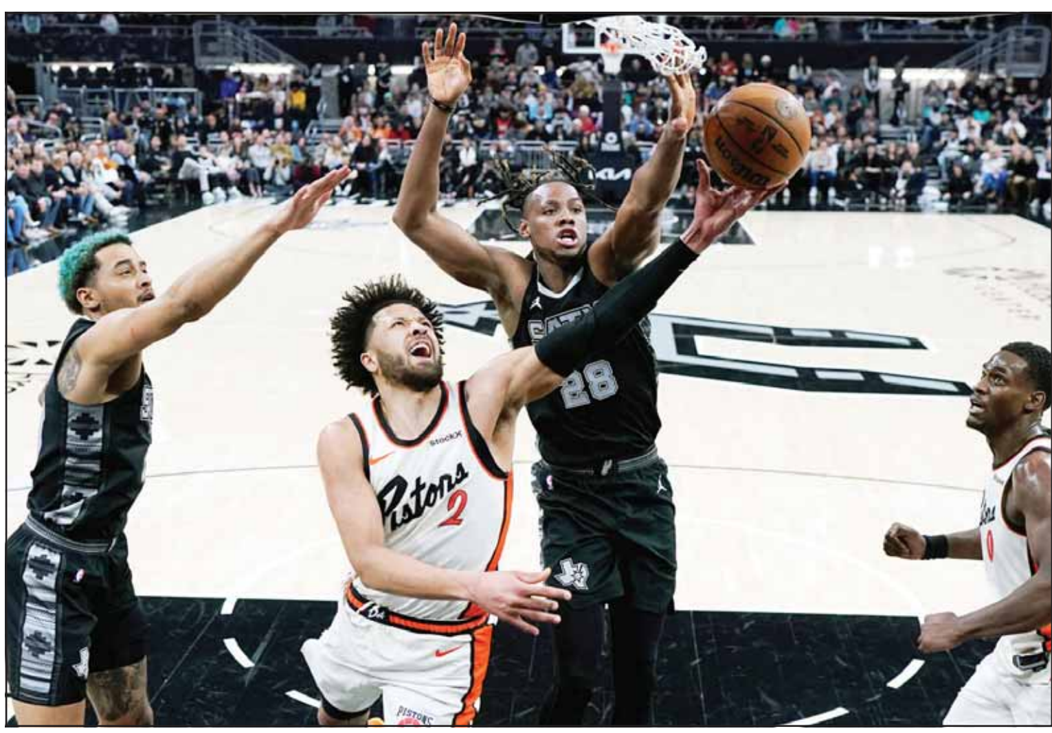
Detroit Pistons guard Cade Cunningham (2) tries to score against San Antonio Spurs center Charles Bassey (28) during the first half of an NBA basketball