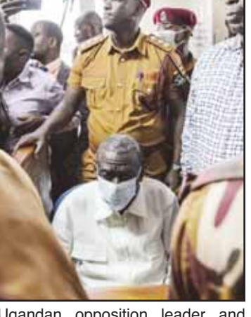
Ugandan opposition leader and presidential candidate four-time Kizza Besigye appears in a civilian court in Kampala, Uganda on Feb 19.

Besigye has looked frail in recent court appearances, leading to concerns