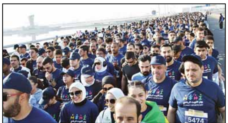
Approximately 20,000 competitors of all genders, including champions with special needs participated in Kuwait Sports Day.