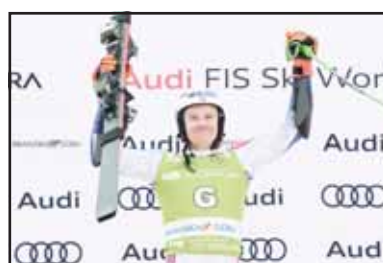
Norway's Henrik Kristoffersen celebrates on the podium after winning an alpine ski, men's World Cup giant slalom, in Kranjska Gora, Slovenia.