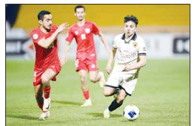
Players battling for the ball.