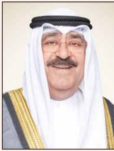
His Highness the Amir