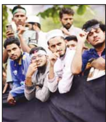
Students listen to their leader during the launch of the new political party called the Jatiya Nagarik Party, or National Citizen Party in Dhaka, Bangladesh on Feb 28.

Thousands of people, mainly youths, gathered to witness the moment. Critics of Nobel Peace laureate