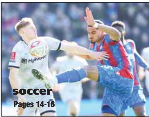
soccer Pages 14-16