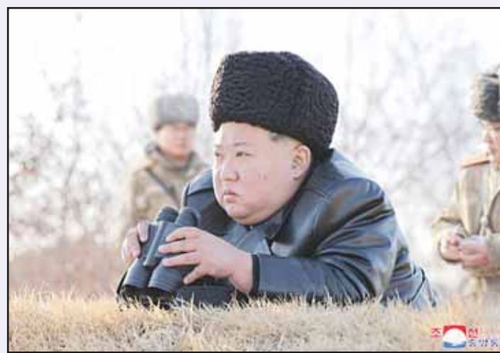
This photo provided on Feb 28, 2025, by the North Korean government, North Korean leader Kim Jong Un oversees test firings of what it says are strategic cruise missiles off the country's west coast on Feb 26.

South Korea's Joint Chiefs of Staff said in a statement later Friday that it had detected and tracked the North Korean launches. It said the South Korean military maintains readiness to repel any potential provocation by North Korea based on the solid South Korea-US mili-