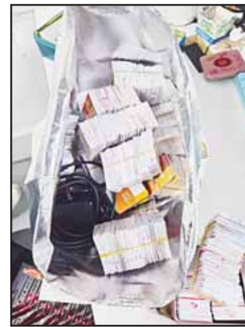
This photo provided by the Philippines Presidential Anti-Organized Crime Commission (PAOCC) on Feb 26, shows dozens of SIM cards found from a raid on a suspected online gambling and scam hub in a busy entertainment district near Manila.

There have been widespread speculation that Philippine law enforcement and regulatory officials have allowed illegal online gambling outfits to operate