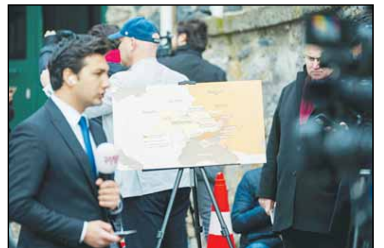
Journalists work outside US Consular General residence where Russian and US diplomats are meeting to discuss operation of embassies, in Istanbul, Turkey on Feb 27.

US and other Western nations cut air links with Russia as part of a slew of sanctions imposed on Moscow after it sent troops into Ukraine on Feb 24, 2022.