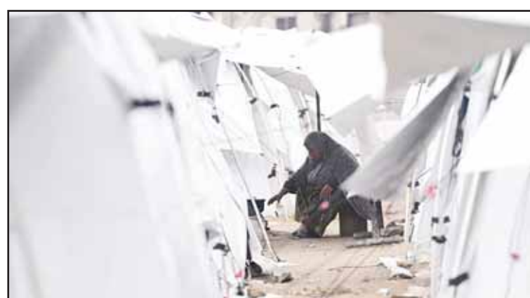
A displaced Palestinian woman cooks in a sprawling tent camp adjacent to destroyed homes and buildings in Gaza City, Gaza Strip, Saturday, March 1, 2025 during the Muslim holy month of Ramadan.