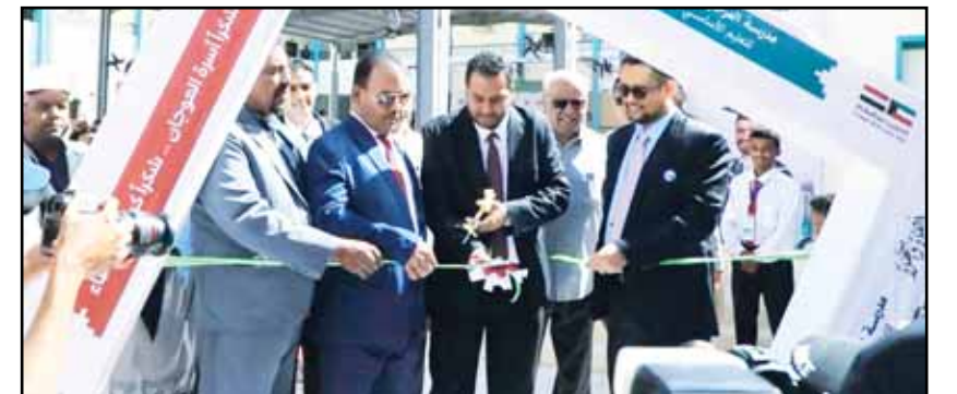
Yemen's Minister of Education Tareq Al-Abkari inaugurated the late Abdulrahman Al-Aujan Primary School in the Governorate of Hadhramaut.

For his part, Krahenbuhl spoke highly of the KRCS as one of the ICRC's key humanitarian partners, along with its initiatives purposed to mitigate the anguish of people hit by natural disasters and man-made crises in many countries.