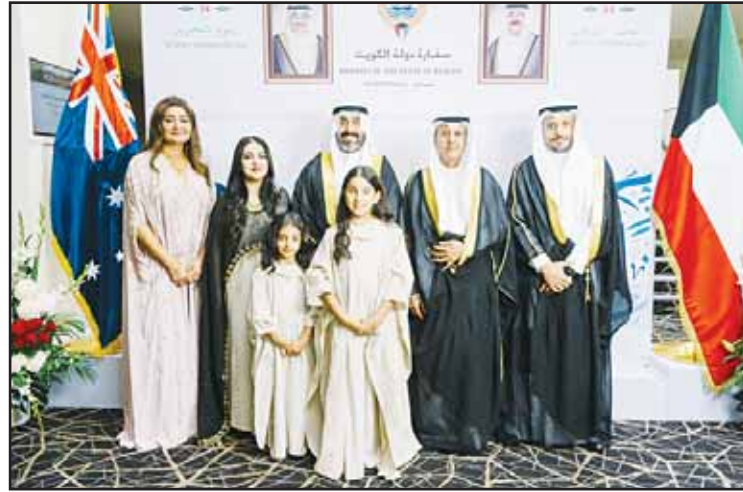
The diplomatic mission of the State of Kuwait to Australia celebrates national holidays.