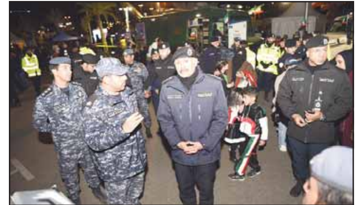
Undersecretary of the Ministry of Interior, Lieutenant General Sheikh Salem Nawaf Al-Ahmad Al-Sabah, inspects the security procedures for national holiday celebrations at a number of locations.