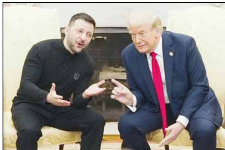
US President Donald Trump, right, meets with Ukrainian President Volodymyr Zelenskyy in the Oval Office at the White House on Feb 28, in Washington.

Zelenskyy's main objective going into the sit-down had been to press Trump not to abandon his country and to warn against moving too closely to Russian President Vladimir Putin. Instead he got shouted at while Trump appeared to play up the drama for the cameras.