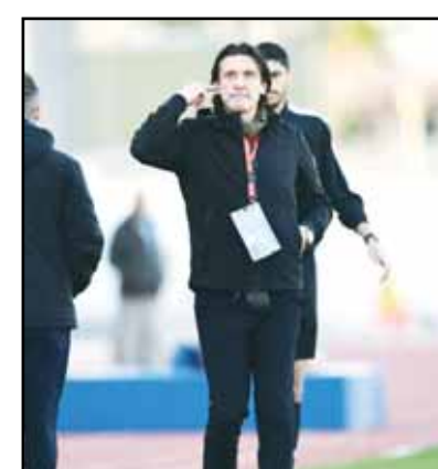
Left-right: Coaches direct players during the Zain Premier League match in Kuwait.