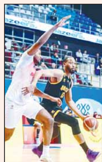
Al-Qadsiya player drives the ball past Kuwait Club player during the basketball league game.

With this victory, Al-Qadsiya handed Kuwait Club its fourth consecutive defeat, further deepening its struggles. Kuwait Club had previously