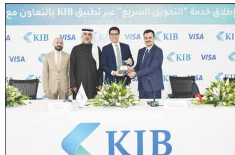
After announcing the launch of the new service, Visa honors KIB.