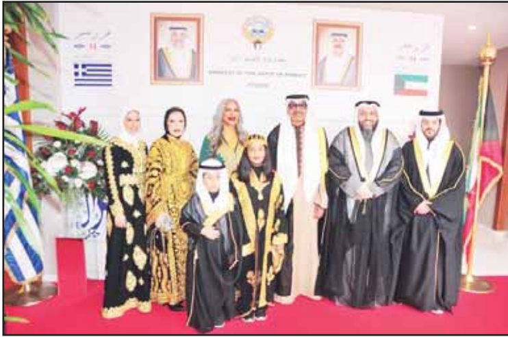
The Kuwaiti Embassy in Greece celebrates national holidays.

Kuwaiti embassies mark national days worldwide