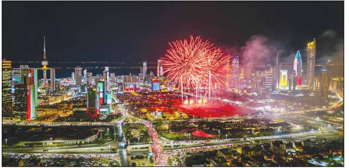
Fireworks lit up Kuwait marking the National and Liberation days.