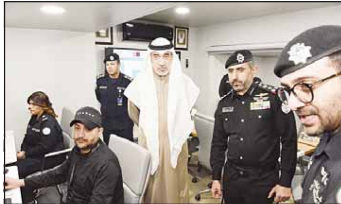
The First Deputy Prime Minister and Minister of the Interior visits the General Administration of the Coast Guard and praises the efforts of its men.