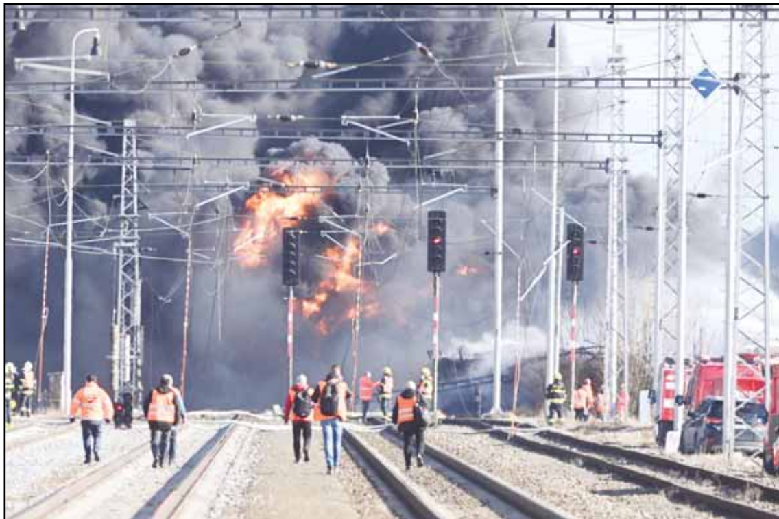
Firefighters battle a large fire of a derailed freight train carrying benzene, a highly flammable and toxic liquid on Feb 28, in Hustopece nad Bečvou, Czech Republic.

The victory for Merz's party Sunday in Germany's national election ensured that Ukraine has an even stronger supporter in the European Union's largest country. Merz during the campaign promised to unite Europe in the face of challenges from both Russia and the United States.