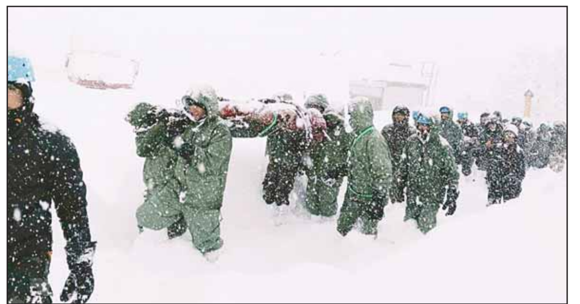
In this handout photo supplied by the Indian Army, a team carries out rescue operations for trapped construction workers who were swept away by an avalanche near the Mana Pass in northern Uttarakhand state in Chamoli district, India on Feb 28. (AP)

"It is the responsible mission and duty of the DPRK's nuclear armed forces to permanently defend the national sovereignty and security with the reliable nuclear shield by getting more thorough battle readiness of nuclear force and full preparedness for their use," Kim added.