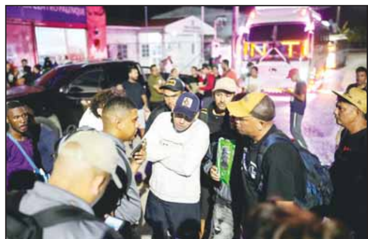
Migrants talk with a Panamanian immigration officer in Palenque, Panama on Feb 26.

Despite Trump's threats to retake control of the Panama Canal, he said Panama had not acted under U.S. pressure. "This is in Panama's national interest. We are a friend of the US and want to work with them to send a signal of deterrence."