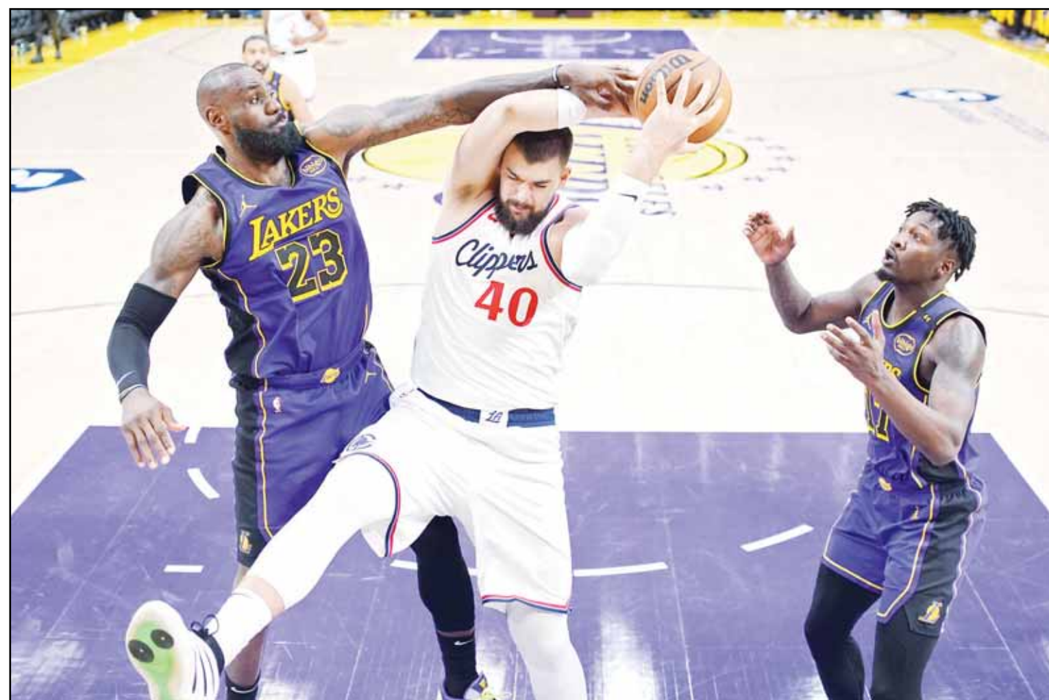
Los Angeles Clippers center Ivica Zubac, center, tries to shoot as Los Angeles Lakers forward LeBron James, left, and forward Dorian Finney-Smith defend during the second half of an NBA basketball game in Los Angeles.