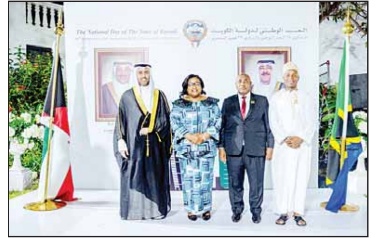
The Kuwaiti Embassy in Tanzania celebrates national holidays.

KUWAIT CITY, March 1, (KUNA): His Highness the Amir Sheikh Meshal Al-Ahmad Al-Jaber Al-Sabah on Wednesday congratulated the nationals and foreign residents in the State of Kuwait on the country's 64th National Day and 34th Liberation Day.