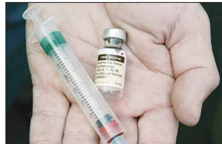
A doctor holds a vial of the human papillomavirus (HPV) vaccine Gardasil in Chicago on Aug. 28, 2006.

Women in their 20s are the group most likely to have been given the HPV vaccine, which has been recommended in the US since 2006 for girls