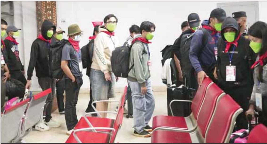
Indonesia nationals who had worked at scam centers in eastern Myanmar walk into a waiting room upon arrival from Thailand, at Soekarno-Hatta International Airport in Tangerang, Indonesia on Feb 28.