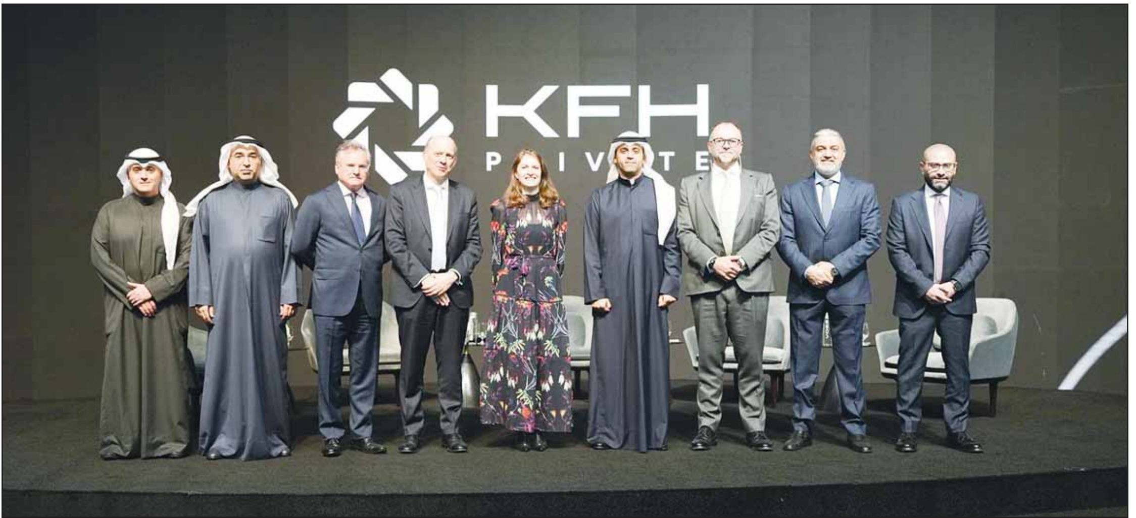
Group photo during the 'Private Banking & Wealth Management Reception'.

Panel discusses future of Islamic finance & global investments