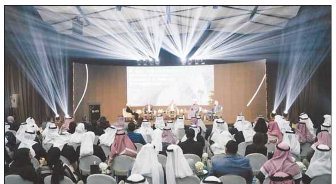
Part of the Private Banking & Wealth Management Reception.