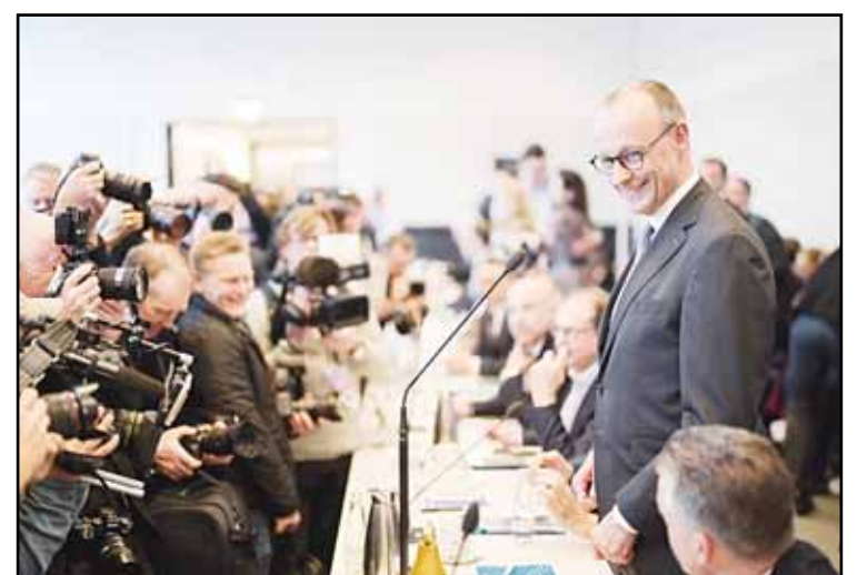
Friedrich Merz, leader of the Christian Democratic Union, CDU, (center right), smiles as he arrives for a faction meeting of the Christian Union party's lawmakers at the parliament Bundestag in Berlin, Germany on Feb 25.

Between them, the Union and Social Democrats have 328 seats in the newly elected 630-seat parliament.