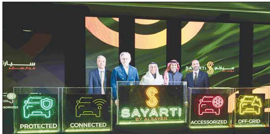
Mohamed Naser Al-Sayer & Sons Est. Co. officials pose for a group photo