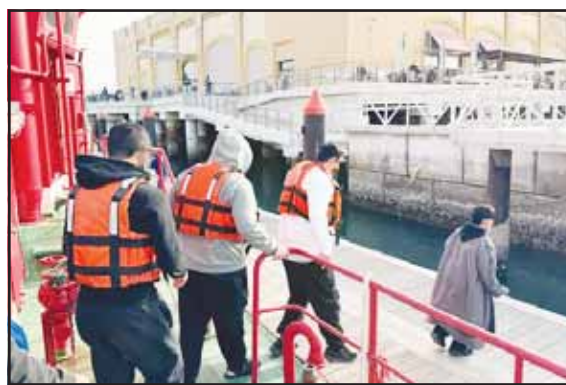
Kuwait Fire Force brings the boat people to safety.

Lieutenant General Sheikh Salem Al-Nawaf concluded his tour with a visit to the Kuwait Security exhibition, where the Ministry of Interior, along with other military institutions, had participated in various sectors.