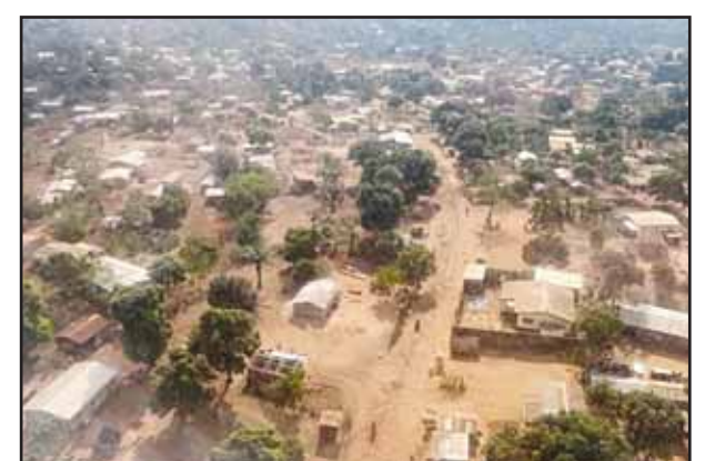
An aerial view of Bangui, Central African Republic, is seen on March 8, 2024.

"MINUSCA contingents are among the actors on the ground who sometimes commit violations. There have been reports of sexual abuse and exploitation by a number of contingents," Agbetsse told a news conference Thursday in Bangui, the capital.