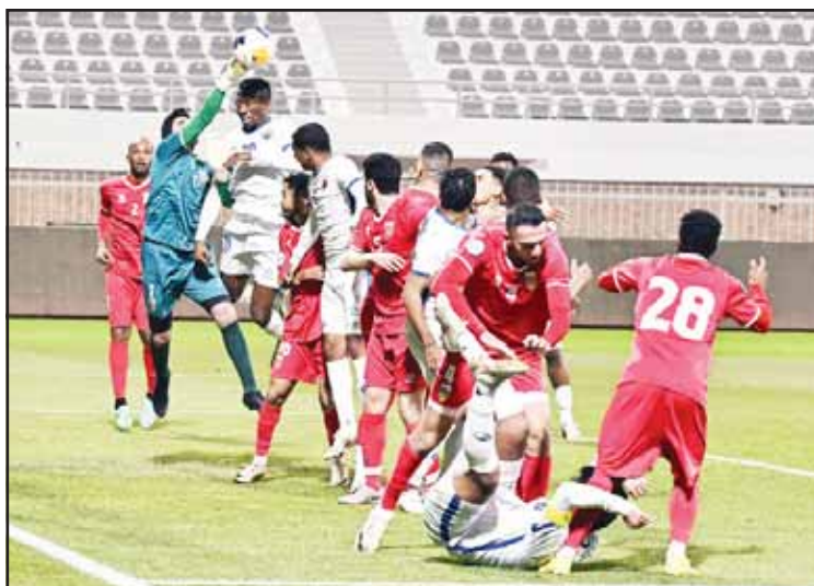
Sulaibikhat and Jahra players in action during the Zain First Division League match.