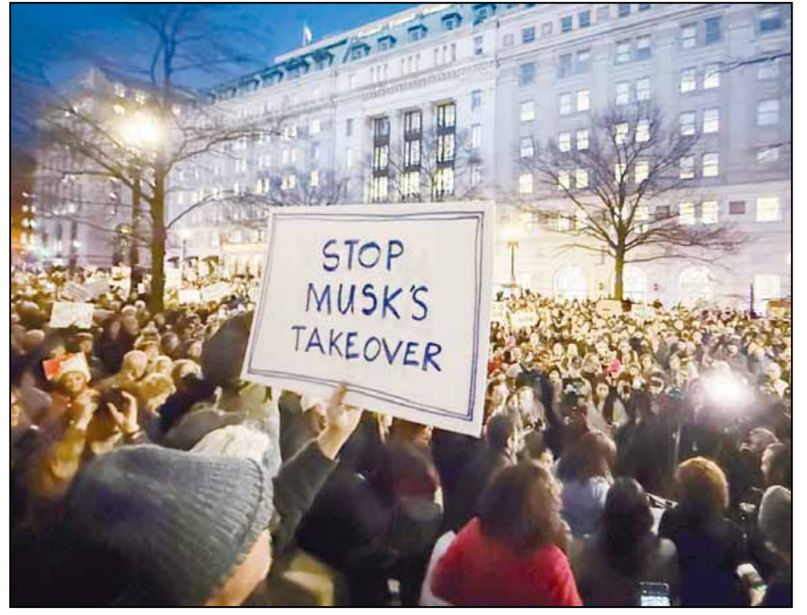
People protest during a rally outside the Treasury Department in Washington on Feb 4.

Both Musk and Trump have claimed that some workers are either dead or fictional, and the president has publicly backed Musk's approach.