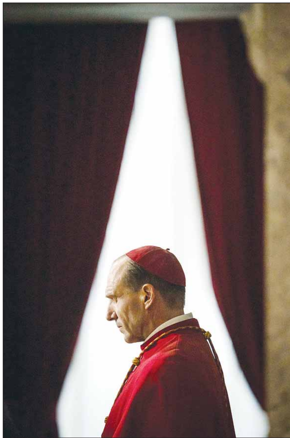
This image released by Focus Features shows Ralph Fiennes in a scene from 'Conclave.'

Francis suffered a setback on Friday, after he inhaled vomit during a coughing fit and required non-invasive mechanical ventilation to breathe. Doctors said they need 24 to 48 hours to evaluate how and if the isolated episode affected his overall clinical