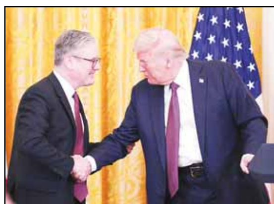
Britain's Prime Minister Keir Starmer, left, and US President Donald Trump shake hands at a joint press conference in the East Room at the White House on Feb 27 in Washington.

On Tuesday, Starmer said the government would raise UK defense spending to 2.5% of gross domestic product by 2027 from the current 2.3%, saying Europe is in a new era of insecurity that requires a "generational response."