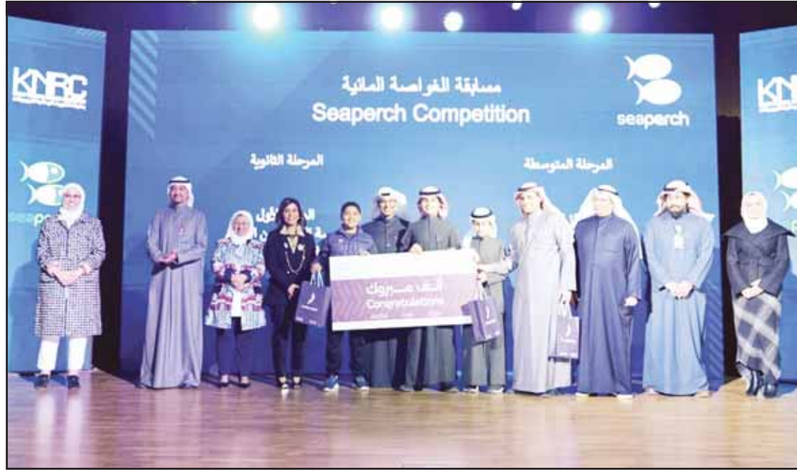
Warba Bank presenting a special honor to the winners of the Kuwait National Robotics Championship, organized by Kuwait University, the Public Authority for Youth, and the Ministry of Education.