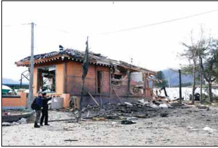
South Korean military investigators examine at the site where a South Korean fighter jet accidentally dropped bombs on a civilian area during training, in Pocheon, South Korea on March 6.

The air force apologized and expressed hopes for a speedy recovery of the injured people. It said it will actively offer compensation and take other necessary steps.