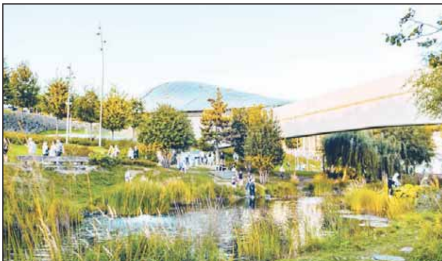
A tourist spot

KUWAIT CITY, March 6: Moscow holds a distinguished status as a premier global tourist destination, drawing visitors from around the world, particularly from Kuwait; owing to its unique blend of ancient history and luxurious modern experiences.