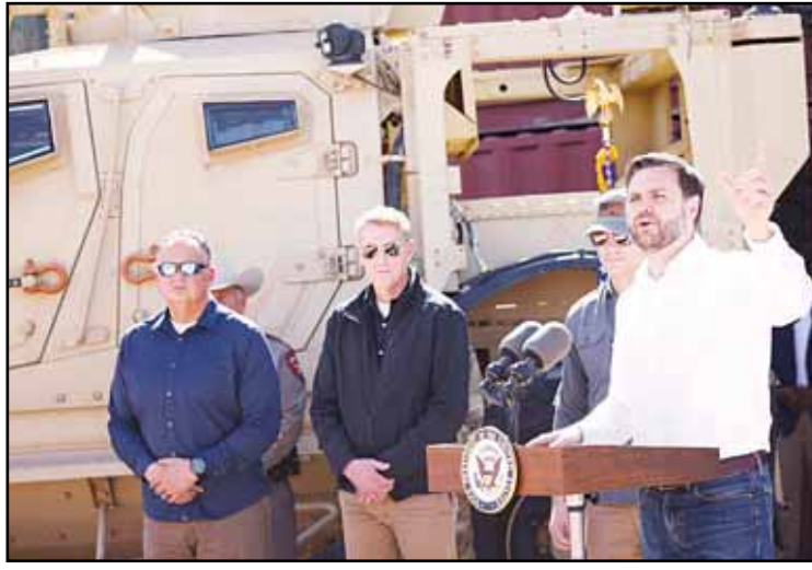
US Vice President JD Vance, right, speaks during a news conference at Shelby Park on March 5, in Eagle Pass, Texas.

The presence of Hegseth and Gabbard on the visit underscores how