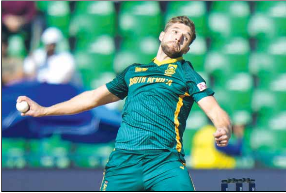
South Africa's Wiaan Mulder bowls a delivery during the ICC Champions Trophy semifinal cricket match between New Zealand and South Africa at Gaddafi Stadium in Lahore, Pakistan.