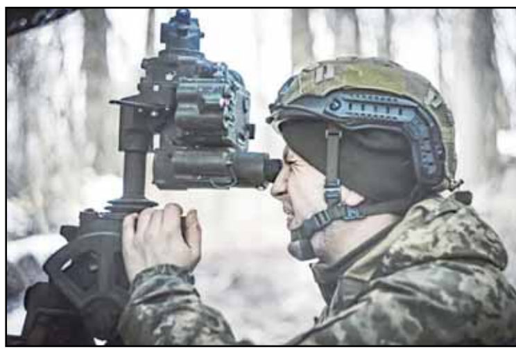
Ukrainian serviceman prepares to fire a M777 howitzer towards Russian positions at the frontline near Donetsk, Ukraine on March 3.

"On the military front and the intelligence front, the pause that allowed that to happen will go away, and I think we'll work shoulder to shoulder