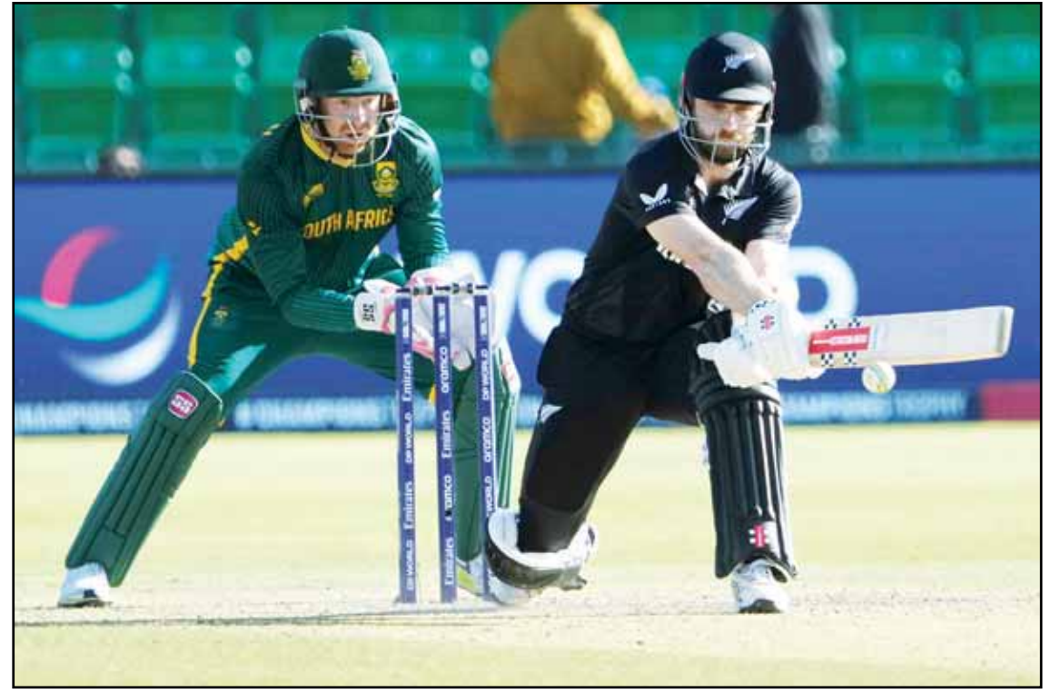
New Zealand's Kane Williamson plays a shot during the ICC Champions Trophy semifinal cricket match between New Zealand and South Africa at Gaddafi Stadium in Lahore, Pakistan.