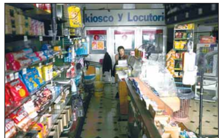
A worker sits inside a dark store affected by a power outage in Buenos Aires, Argentina on March 5.

It is now Haiti's third international airport, a development that is expected to boost the local economy and provide a new way for some nonprofits to distribute sorely needed aid.