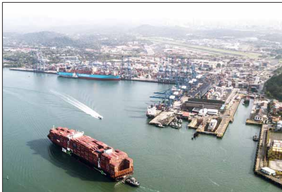
A cargo ship sails next to the Panama Canal's Balboa port in Panama City on Feb 1.

"The Philippines has a truly unique relationship with the United States," he said, adding that the decades-old alliance has "stood the test of time."