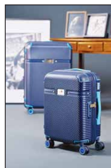
Samsonite luggage collection.

The Samsonite x Pelé collection consists of two Luggage Cases (Spinner 75/28 and Spinner 55/20), a 15.6" EXP Laptop Backpack, a Crossover S Bag and a Clutch Bag. Each piece features design elements inspired by Pelé's legendary ca-