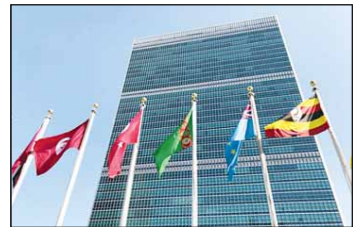
Flags fly outside the United Nations headquarters on Sept 28, 2019.

"Globally, women's human rights are under attack," UN Secretary-General Antonio Guterres said in a statement. "Instead of mainstreaming equal rights, we're seeing the mainstreaming of misogyny."