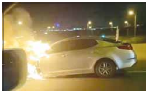
The vehicle on fire.

Without interest, there is no lawsuit. Therefore, the Public Prosecution cannot appeal rulings purely for the sake of the law, as its appeal would be considered a theoretical matter that holds no legal weight.