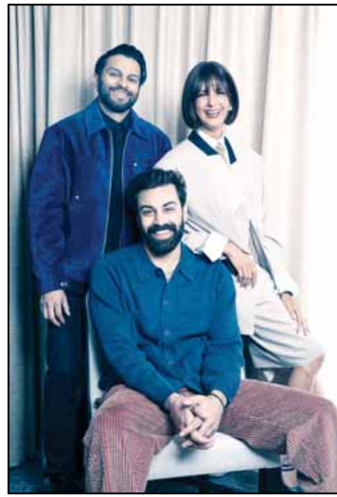
Asif Ali, (from left), Saagar Shaikh and Poorna Jagannathan pose for a portrait to promote 'Deli Boys' on Tuesday, Feb. 25, 2025, in Los Angeles.

"It's just lore," he said of the stories he was never able to report out. "But in this show, we can borrow all that stuff, right? And so, like, there's all these elements about, you know, stealth, like how