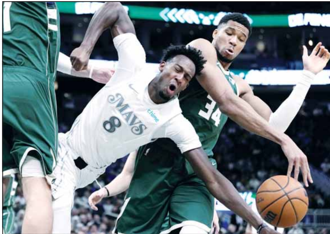
Milwaukee Bucks' Giannis Antetokounmpo fouls Dallas Mavericks' Olivier-Maxence Prosper during the first half of an NBA basketball game in Milwaukee.

Bam Adebayo scored a season-high 34 points for Miami, which was without leading scorer Tyler Herro.