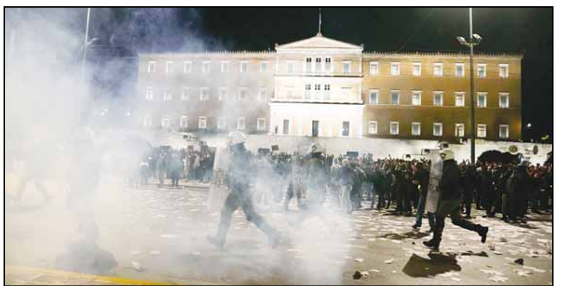
Riot police use tear gas against protesters during a rally, after the Greek opposition parties have challenged the country's center-right government with a censure motion in parliament over a devastating rail disaster nearly two years ago, in Athens on March 5.

It also said for the first time in a U.N. document that human rights include the right of women to control and decide "on matters relating to their sexuality, including their sexual and reproductive health, free of discrimination, coercion and violence."