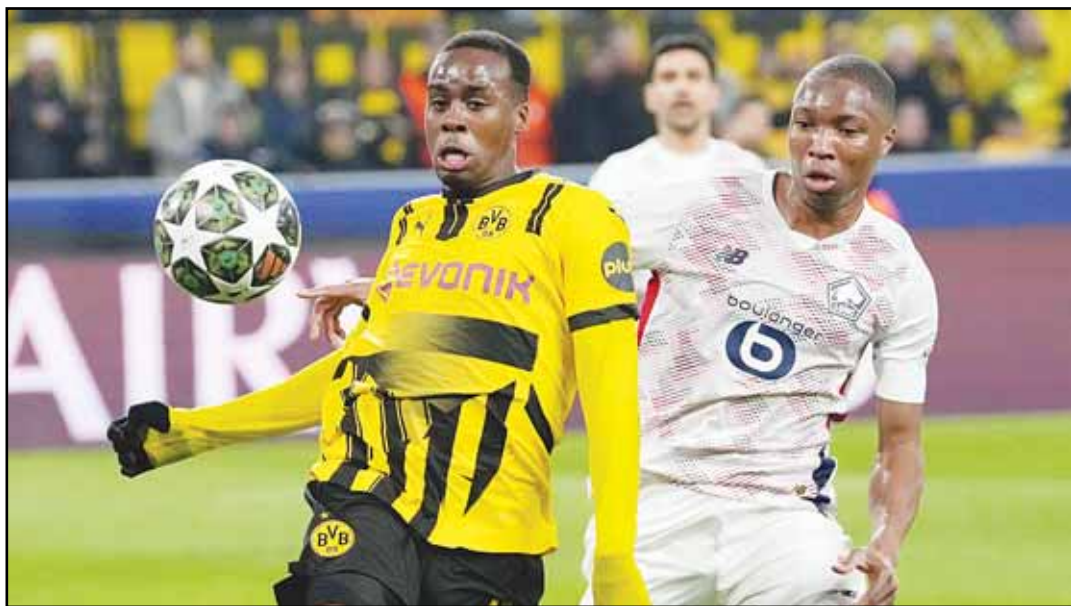
Dortmund's Jamie Bynoe-Gittens, left, and Lille's Bafode Diakite go for the ball during the Champions League round of 16 first leg soccer, between Borussia Dortmund and Lille at the Signa-Iduna Park in Dortmund, Germany.

Media outlet Sport Bild reported that players under contract could face salary reductions of up to 15 percent if targets such as qualification for the 2025-26 Champions League are not met.