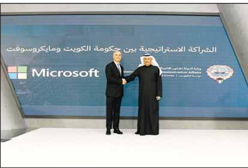
Minister of State for Communications Affairs Omar Saud Abdul-Aziz Al-Omar with Samer Abu-Latif, Microsoft's corporate vice-president for Central and Eastern Europe, Middle East and Africa (CEMA) area.

It will be warm on Saturday as the heat will be 24-22 degrees during day time and drop to 11 degrees at night.