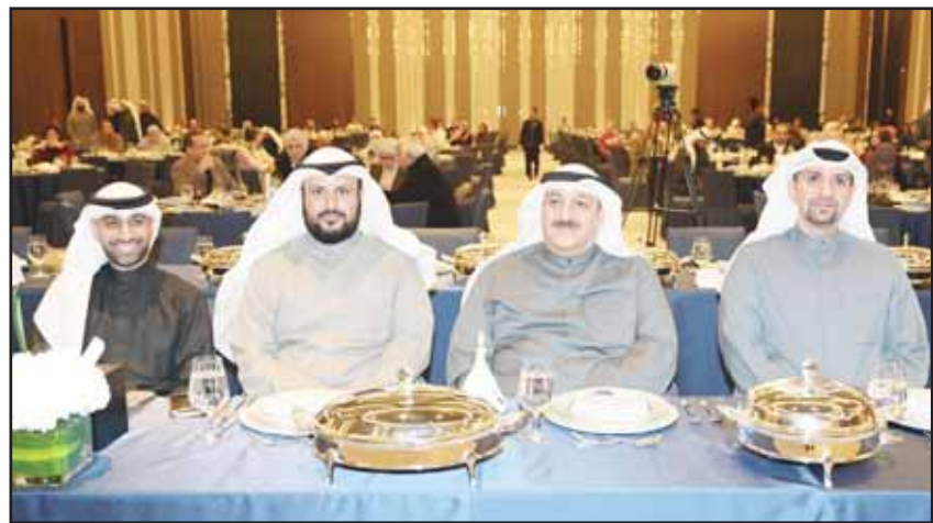
Minister of Health Dr. Ahmed Al-Awadhi (center) at the ghabqa.

She stressed the importance of the State's role in promoting the use of public transportation to achieve Kuwait's vision as a financial and commercial center. She added that traffic to and from Sabah Al-Salem University City exceeds planned numbers, prompting her to submit a comprehensive traffic study for the area.