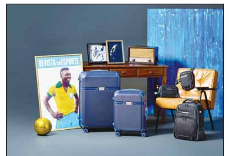
Pelé's iconic legacy meets Samsonite innovation in new luggage collection.

reer. The Spinner 75/28 and Spinner 55/20 are embellished with a classy metal collaboration logo plate and also come with a luggage cover printed with a silhouette of Pelé's iconic bicycle kick. Inside, the interior lining of both luggage cases is adorned with a pattern that pays homage to Pelé's three World Cup victories with Brazil. All pieces in the collection are accented with external trim in celestial blue.