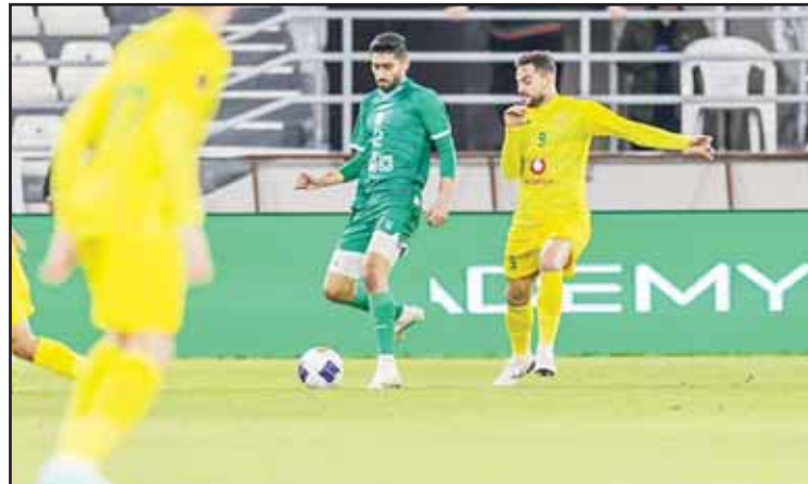
Al-Arabi and Al-Seeb players fighting for the ball.

determination and expressed confidence in their ability to deliver a strong performance in Muscat. He noted that the tie remains open, but Al Arabi will fight to secure qualification and bring joy to their fans.