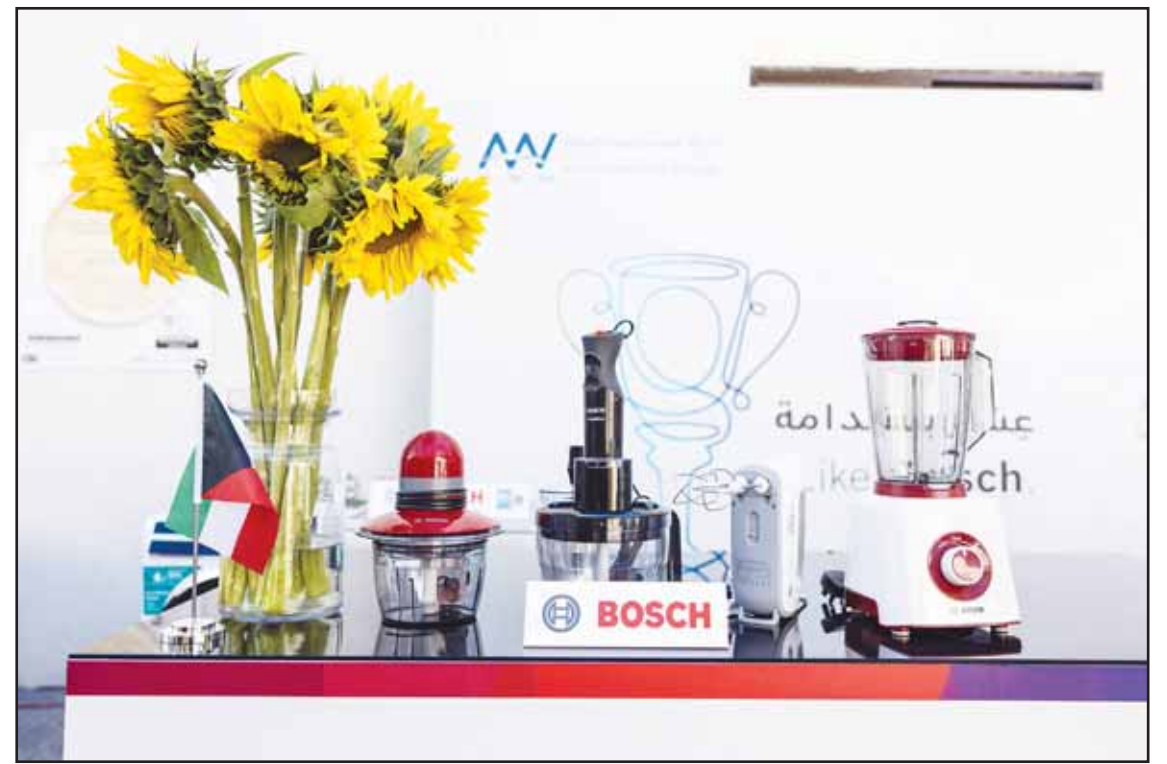
Bosch equipment showcased during the event.