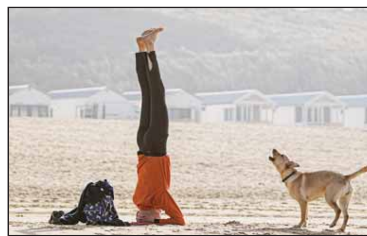
A dog barks at his master during a yoga exercise on a sunny day on the beach in Katwijk, Netherlands, Monday, March 3, 2025. (AP)

Some expert tips include choosing a mattress that is large enough for you and your pets, washing and changing your bedding regularly, and establishing and maintaining a consistent bedtime routine with your pets. Further research is needed to identify more specific habits and routines that pet owners can adopt to ensure a good night's sleep when sharing the bedroom with their pets. (AP)