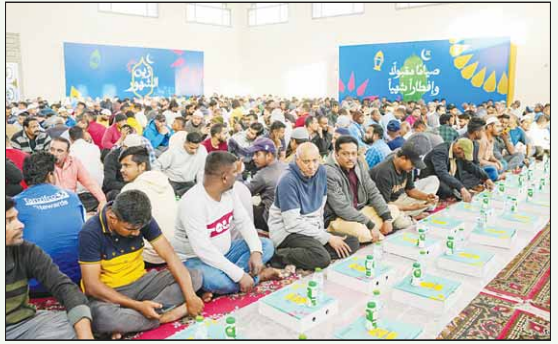
The initiative runs daily throughout the Holy Month.

Initiative continues for 18th year with 40K meals served throughout holy month