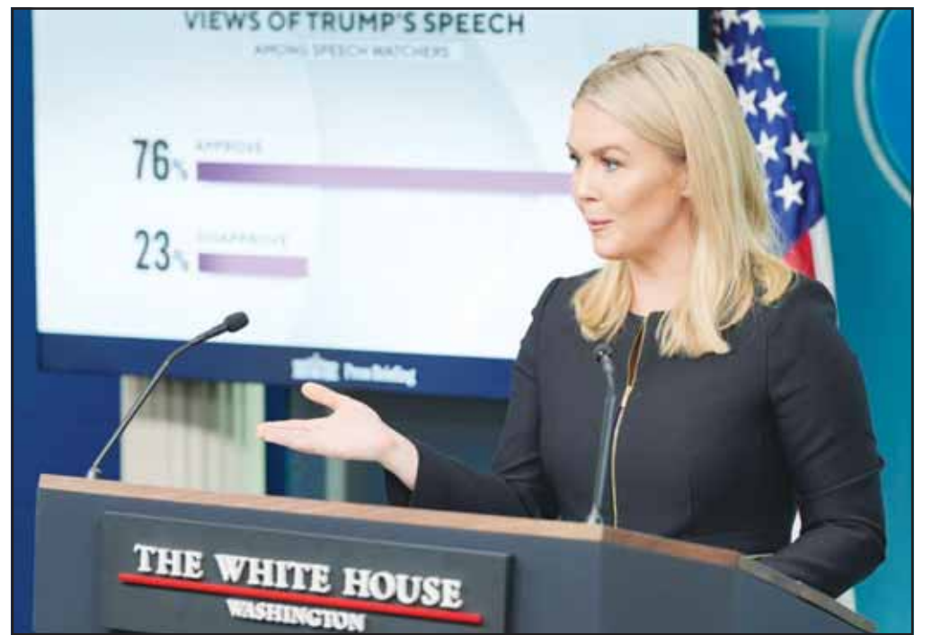
White House press secretary Karoline Leavitt speaks with reporters in the James Brady Press Briefing Room at the White House, Wednesday, March 5, 2025, in Washington.

The White House repeatedly insisted that it would not grant exemptions and the sudden turnaround reflects the economic and political problems being