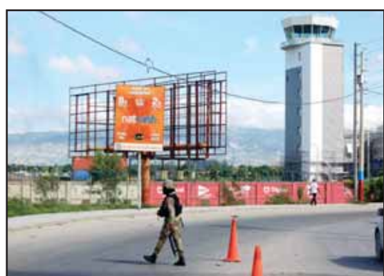
A police officer patrols the entrance of the Toussaint Louverture International Airport, in Port-au-Prince, Haiti, Nov 12, 2024.

Later Wednesday afternoon, service resumed on all but two train lines, the capital's subway franchisee said. Officers rescued people temporarily trapped in elevators. Pedestrians were left broiling on sidewalks downtown, unable to cross the traffic-snarled main thoroughfare of Avenida 9 de Julio.