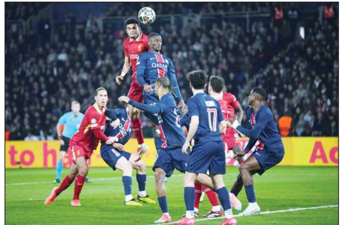
Liverpool's Luis Diaz, left, and PSG's Nuno Mendes jump for the ball during the Champions League round of 16 first leg soccer match between Paris Saint-Germain and Liverpool in Paris, France.