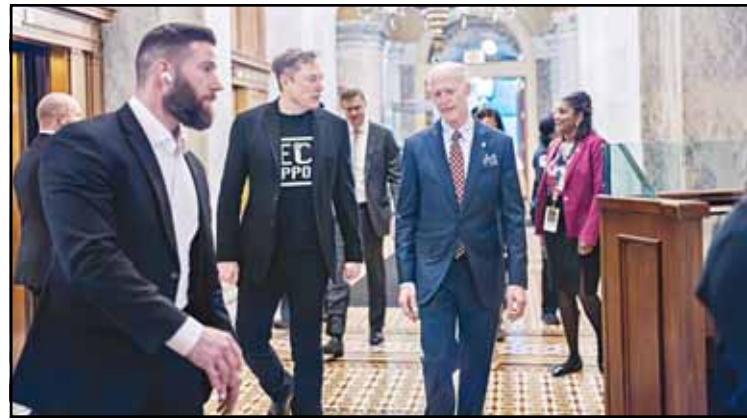
Elon Musk, (center left), operating with a directive from US President Donald Trump to slash government spending, walks with Sen. Rick Scott, R-Fla., right, as he arrives to meet with Republican senators, at the Capitol, in Washington on March 5.