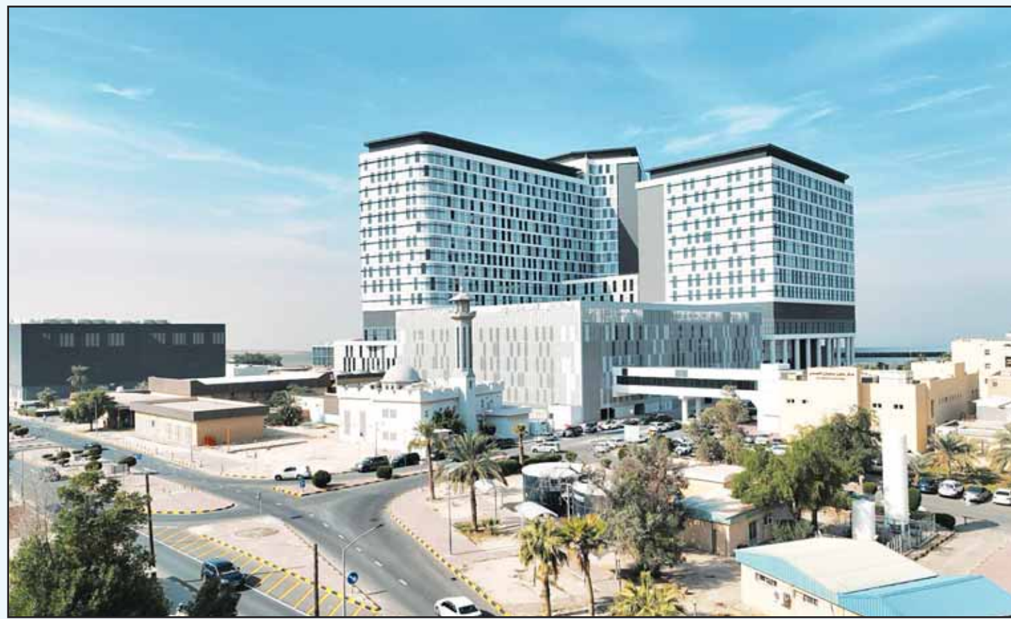
Maternity hospital building