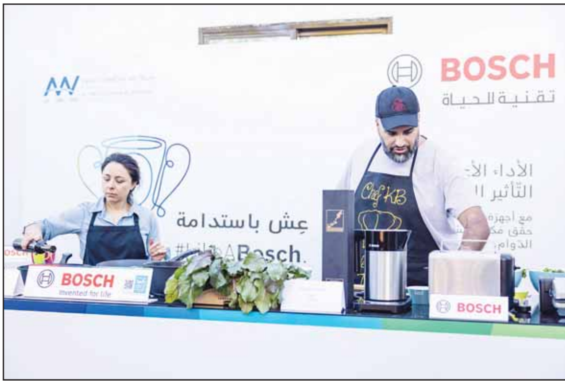
A picture of the professional chefs participating in the 'From Planet to Plate' event.