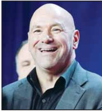
In this file photo, Dana White watches as Republican presidential nominee former President Donald Trump speaks at an election night watch party at the Palm Beach Convention Center, in West Palm Beach, Fla.

"I like taking things that are broken, can't be fixed and I'm going to