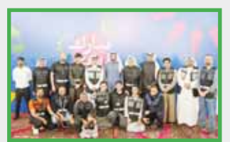
8 Zain welcomes fasting individuals with daily iftar meals