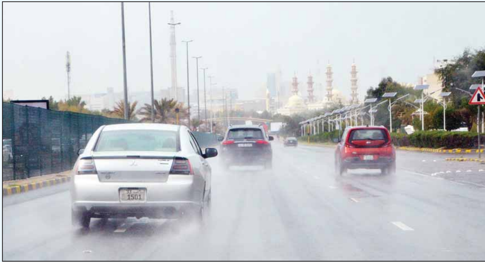
Rain pours down as drivers navigate through the slick Airport Road, heading toward Shuwaikh on Thursday.