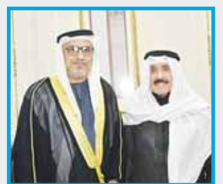
5 Sheikh Nasser Al-Mohammad welcomes Ramadan well-wishers