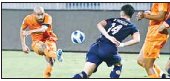
In this file photo, Kazma player shoots the ball as an opponent defends.