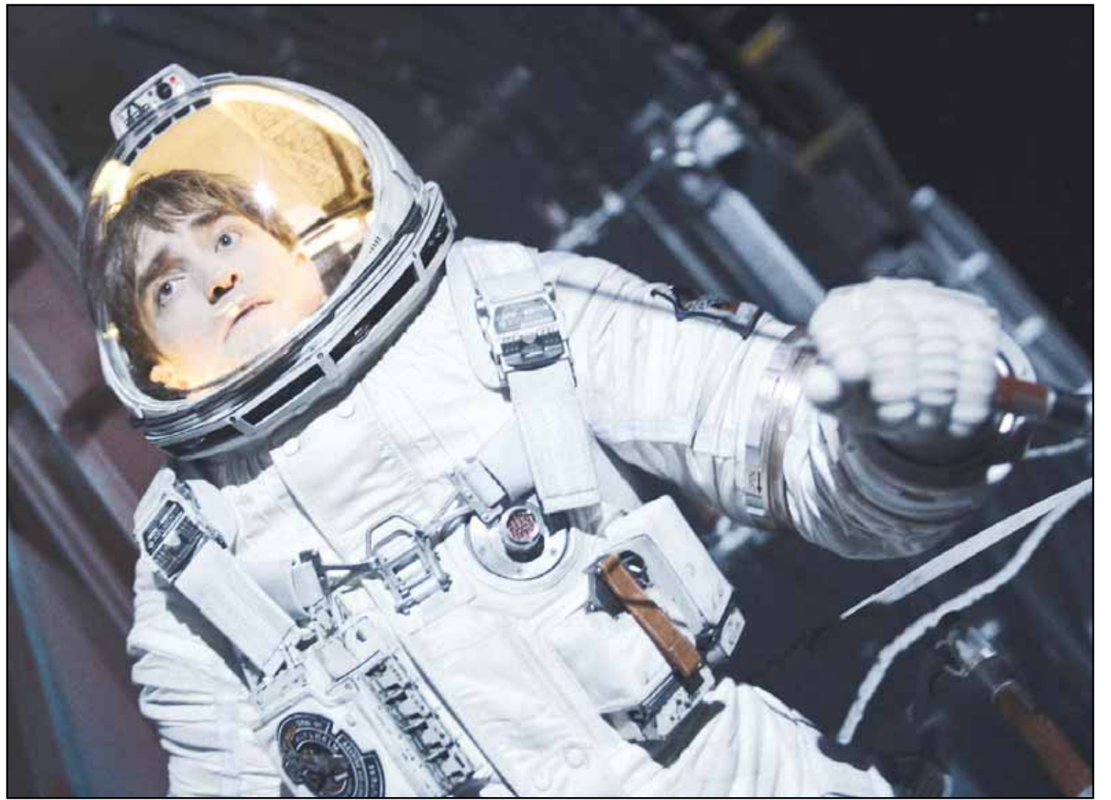
This image released by Warner Bros. Pictures shows Robert Pattinson in a scene from 'Mickey 17.'