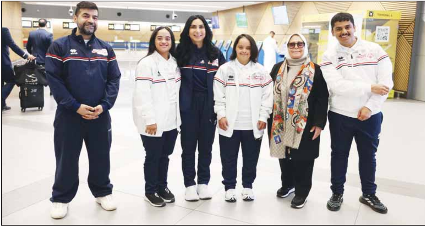
The Kuwaiti Special Winter Olympic delegation.

Historically, their Crown Prince Cup encounters have been memorable. In the 2015-2016 edition, Al-Shabab triumphed 3-1 on penalties after a 1-1 draw. Their most famous showdown came in the 2014-2015 quarter-finals, where a 2-2 draw led to a dramatic penalty shootout, ultimately won by Fahaheel (14-13).