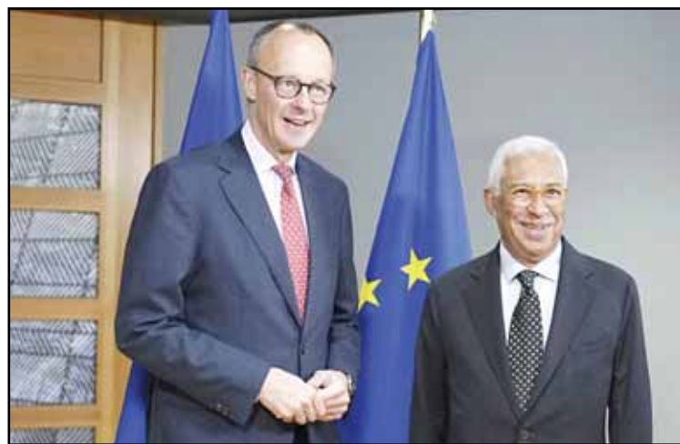
European Council President Antonio Costa, (right), greets Friedrich Merz, leader of the Christian Democratic Union, prior to a meeting at the European Council building in Brussels on March 6.

A Russian missile killed four people staying at a hotel in Zelenskyy's hometown overnight. He said that a humanitarian organization's volunteers had moved into the hotel in Kryvyi Rih, in central Ukraine, just before the strike.