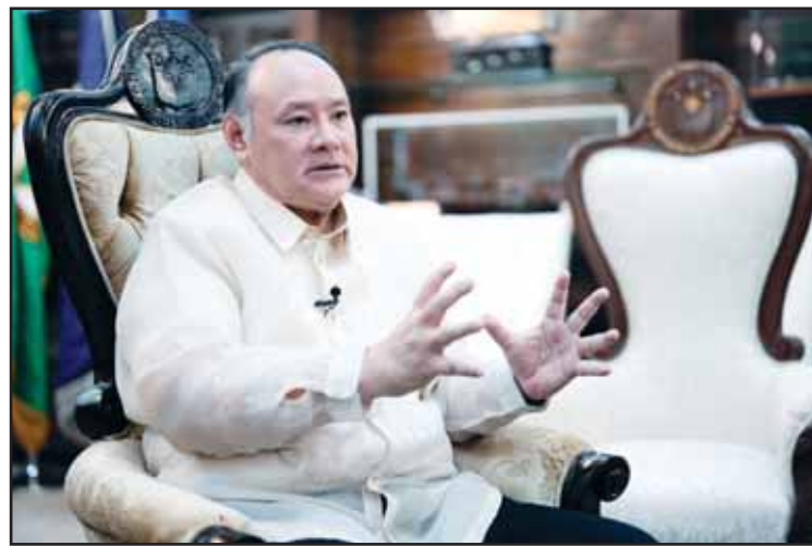
Philippine Defense Secretary Gilberto Teodoro answers questions during an interview with the Associated Press at the Department of National Defense headquarters in Quezon city, Philippines on March 5.

Last month, a Chinese navy helicopter flew within 10 feet (3 meters) of a Philippine patrol turbo-prop plane it warned had encroached in what Bei-