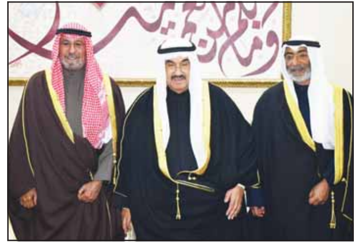
Leading the well-wishers, His Highness the Crown Prince Sheikh Sabah Al-Khaled, joined by several members of the ruling family.