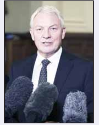
Then-Auckland Mayor Phil Goff talks to the media in Auckland, New Zealand on June 16, 2021.

Churchill's speech rebuked Britain's signing of the Munich Agreement with Adolf Hitler, allowing Germany to annex part of Czechoslovakia. Goff quoted Churchill as saying to Chamberlain, "You had the choice between