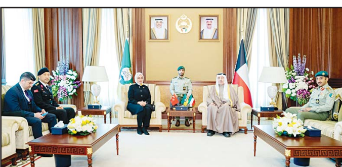
Chief of the Kuwait National Guard receives the Turkish Ambassador to Kuwait.

In turn, the Turkish ambassador lauded the strong relationship between Kuwait and Turkiye and mutual cooperation in all fields.