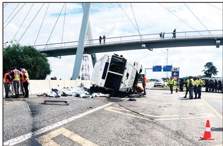
Emergency officials stand next to a bus that overturned on a highway in Johannesburg, South Africa on March 11 killing multiple people and injuring some.

In a statement sent to The Australian newspaper, Bishop's company said it was "a private-advisory firm engaged to provide strategic analysis and guidance."