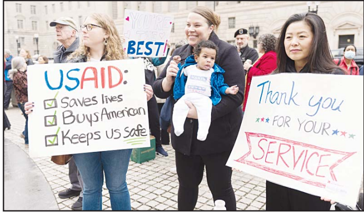
United States Agency for International Development (USAID) supporters hold banners as USAID workers retrieve their personal belongings from the USAID's headquarters in Washington on Feb 27.

"The constitutional power over whether to spend foreign aid is not the President's own - and it is Congress's own," Ali wrote.