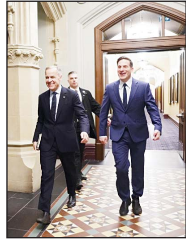
Canada's Liberal Leader Mark Carney, (left), arrives at the West Block of Parliament Hill with Liberal member of Parliament Marco Mendicino in Ottawa, Canada, on March 10.

He navigated crises when he was the head of the Bank of Canada from 2008, and then in 2013 when he became the