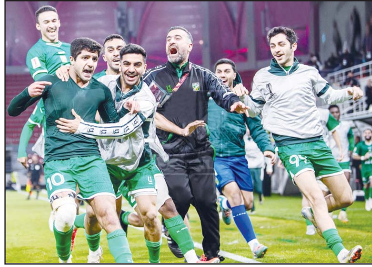
In this file photo, Al Arabi players celebrate after winning the first leg.