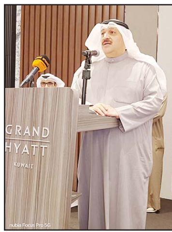
Minister of Health Dr. Ahmad Al-Awadhi delivers his speech.

KUWAIT CITY, March 11: Minister of Health Dr. Ahmad Al-Awadhi affirmed the importance of developing the work of pharmacists in both the public and private sectors, due to the crucial role played by pharmacy professionals, which reflects in the advancement of health services in Kuwait.