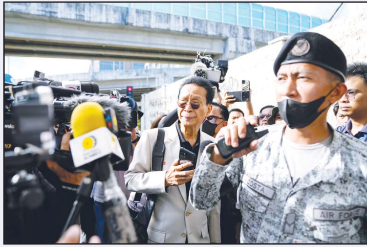
Salvador Panelo, center, former presidential spokesman and chief presidential legal counsel during the Duterte administration tries to enter the gates of Villamor air base where former Philippine President Rodrigo Duterte is being held after he was arrested on March 11, near Manila, Philippines.

The warrant of arrest sent by the ICC to Philippine officials, a copy of which was seen by The Associated Press, said "there are reasonable grounds to believe that" the attack on victims "was both widespread and systematic: the attack