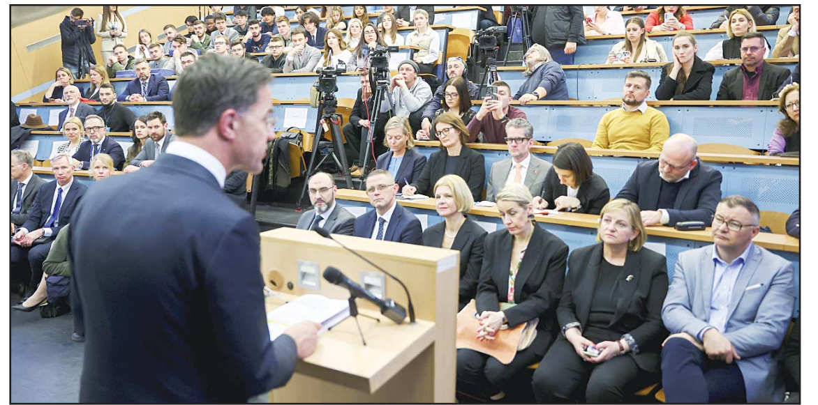
NATO Secretary General Mark Rutte speaks during lecture at the Faculty of Political Sciences in Sarajevo, Bosnia on March 10.

Opinion polls show most Greenlanders favor independence.