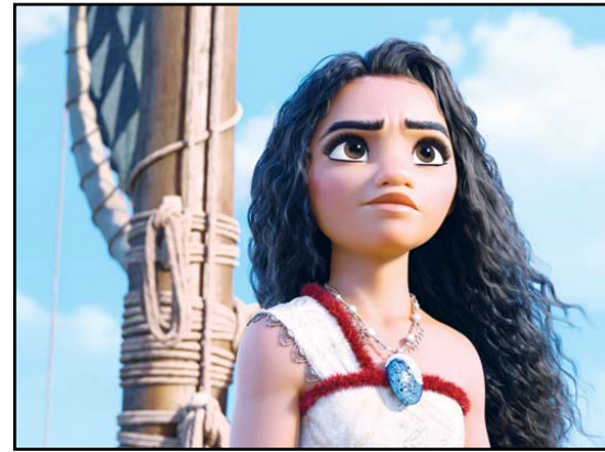
This image released by Disney shows the character Moana, voiced by Auli'i Cravalho, in a scene from 'Moana 2.'

In the latter versions of the story, the title character, vacationing in Hawaii with his parents, befriends a group of