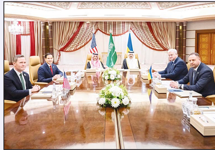
From left: US National Security Advisor Mike Waltz, US Secretary of State Marco Rubio, Saudi Arabian Foreign Minister Prince Faisal bin Farhan, Saudi National Security Advisor Mosaad bin Mohammad al-Aiban, Ukrainian Foreign Minister Andrii Sybiha, and Ukrainian Head of Presidential Office Andriy Yermak hold a meeting in Jeddah, Saudi Arabia on March 11.

Ukrainian officials, including the country's top diplomat and defense chief, sat without expression at a table across from them as the meeting got underway at a luxury hotel. There was no immediate comment from Ukrainian or US officials on the