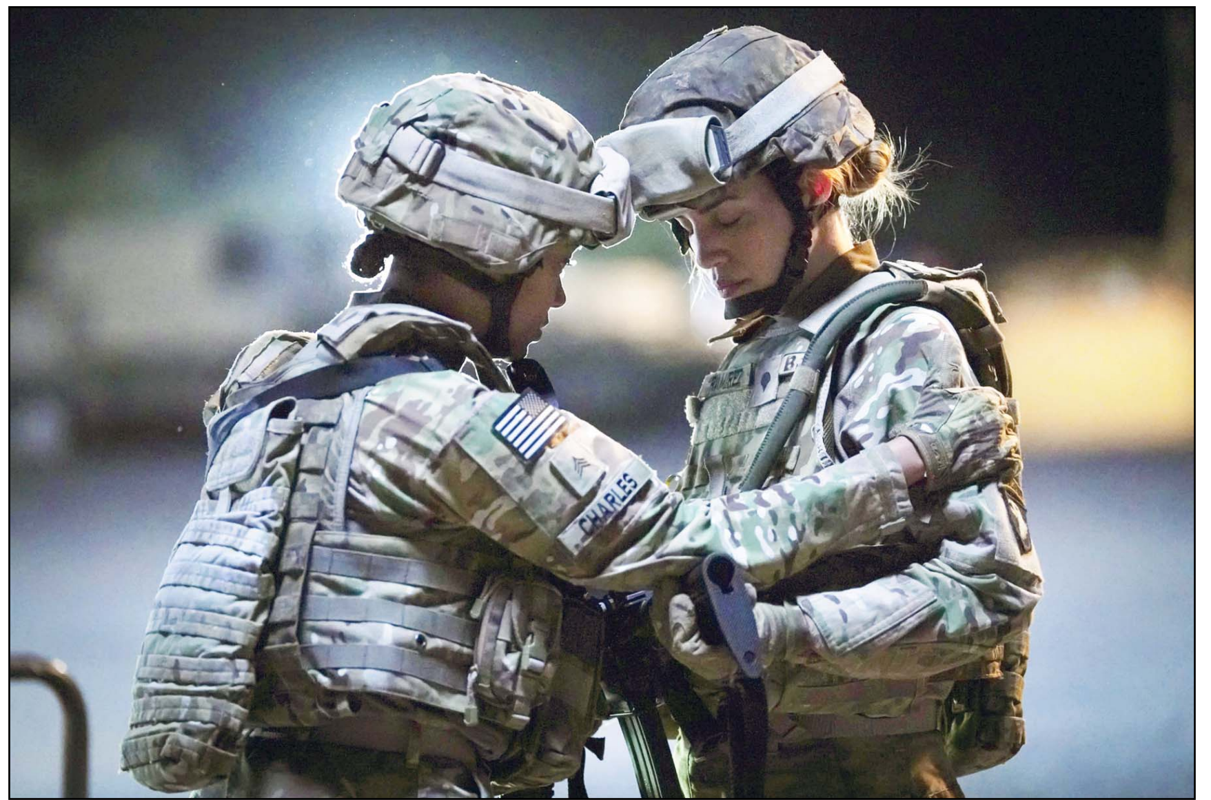
shows Natalie Morales, (right), and Sonequa Martin-Green in a scene from 'My Dead Friend Zoe.'