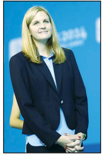
Kirsty Coventry, famous swimmer of Zimbabwe prepares to award medals before the awarding ceremony of Nanjing 2014 Youth Olympic Games in Nanjing, capital of east China's Jiangsu Province.

"We are already putting things in place to allow, let's take Milano Cortina next year, to be a little bit more spread out, to use existing police facilities within a region," she said. "We are no longer saying,