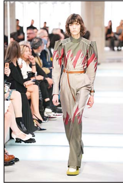
A model wears a creation as part of the Louis Vuitton Fall/Winter 2025-2026 Womenswear collection.