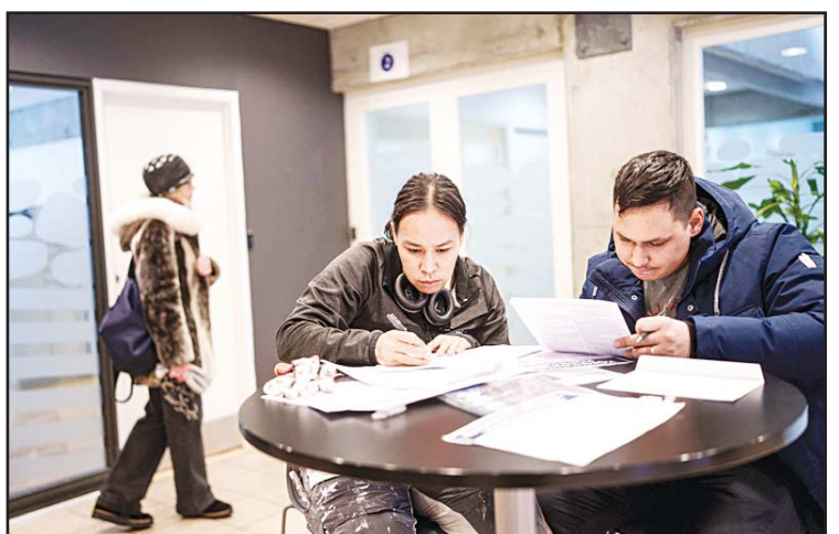
People vote during an early voting for Greenlandic parliamentary elections at the city hall in Nuuk, Greenland on March 10. (AP)

Rutte called any actions that undermine the accord, the constitutional order or national institutions "unacceptable," and added: "Inflammatory rhetoric and actions are dangerous. They pose a direct threat to Bosnia and Herzegovina's stability and security." (AP)