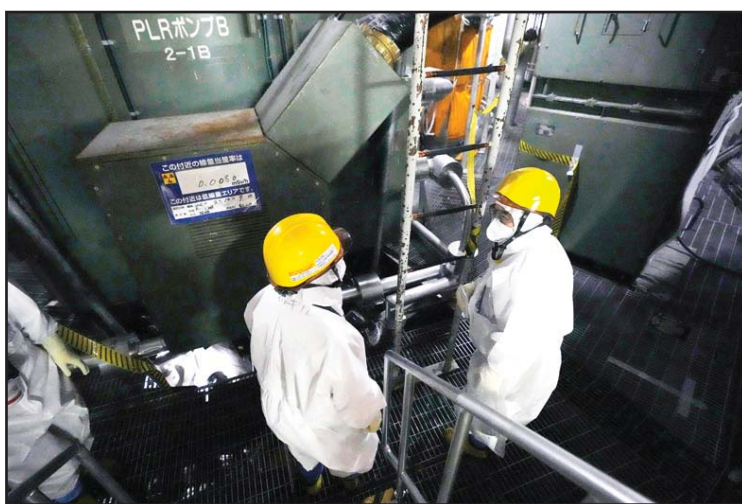
Tokyo Electric Power Company Holdings (TEPCO) employees speak as they take AP journalists to the area at the Unit 5 reactor pressure vessel, which survived the earthquake-triggered tsunami in 2011, at the Fukushima Daiichi nuclear power plant, run by TEPCO, in Futaba town, northeastern Japan, on Feb. 20.

That first successful test run is a crucial step in what will be a daunting, decades-long decommissioning