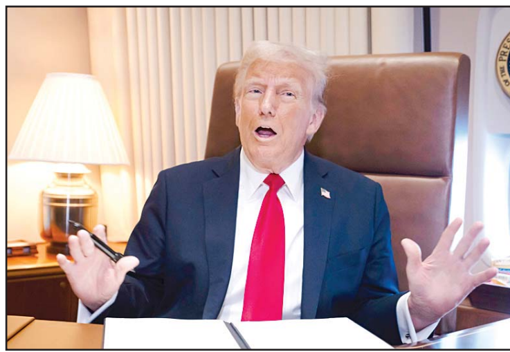
US President Donald Trump speaks to reporters aboard Air Force One as he travels to New Orleans on Feb 9.

Everyone, it seems, is responding to Trump. But nearly two months after his blizzard of executive orders, threats and trade wars, some leaders are steadying their messages with defiance and plans - not that they will necessarily change the Trump admin-