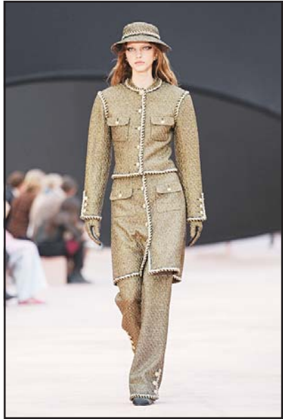
A model presents a creation as part of the Chanel Fall/Winter 2025-2026 Womenswear collection.