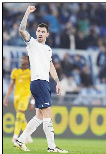
Lazio's Alessio Romagnoli celebrates after scoring his side's first goal during the Serie A soccer match between Lazio and Udinese at the Rome's Olympic stadium, Italy.

Inter Milan midfielder Piotr Zielinski could be out for a few weeks after a calf strain.