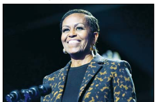
Former first lady Michelle Obama speaks at a campaign rally for democratic presidential nominee Vice President Kamala Harris in Kalamazoo, Mich., on Oct. 26, 2024.

Obama has had two other podcasts - "The Michelle Obama Podcast" in 2020 and another in 2023, "The Light We Carry." Her husband, Barack Obama, offered a series of conversations about American life between him and Bruce Springsteen.