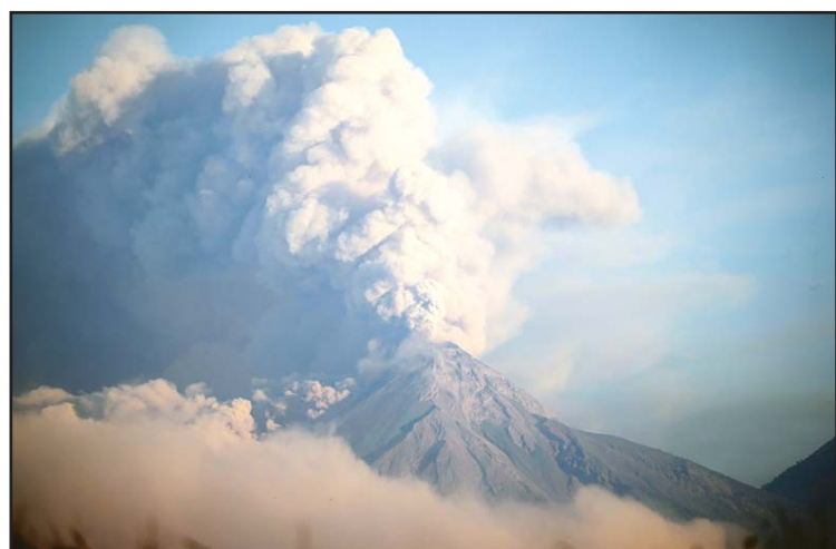
The 'Volcan de Fuego,' or Volcano of Fire, blows a cloud of ash seen from Palin, Guatemala on March 10.

The volcano is 33 miles (53 km) from Guatemala's capital.