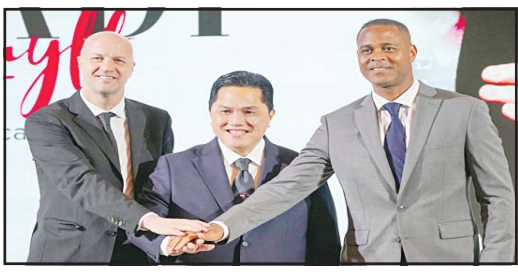
The Chairman of Indonesian National Soccer Association (PSSI) Erick Thohir, center, poses for photographers with newly appointed technical advisor of Indonesia's national soccer team Jordi Cruyff, son of Netherlands' legendary soccer Johan Cruyff, left, and head coach Patrick Kluijvert, right, during a press conference in Jakarta, Indonesia.