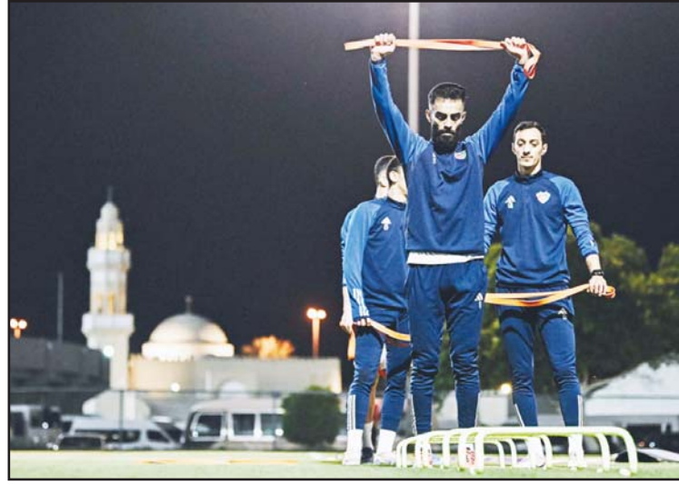
Players intensify training for the qualifiers.