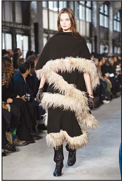
A model wears a creation as part of the Sacai Fall/Winter 2025-2026 Womenswear collection.