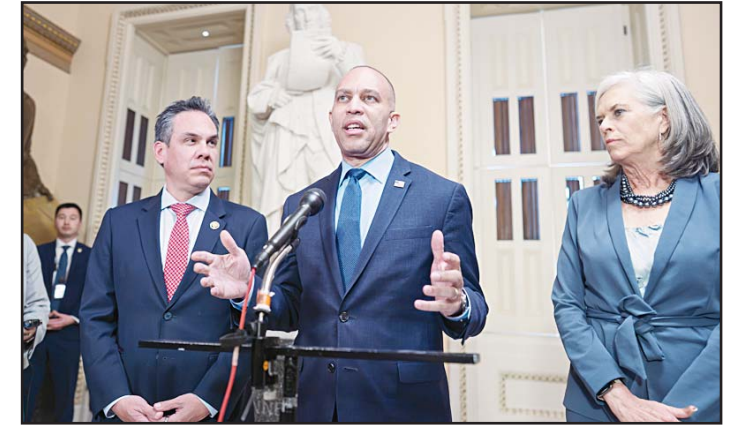
US House Minority Leader Hakeem Jeffries, D-NY, (center), flanked by Rep Pete Aguilar, D-Calif. (left), and Rep Katherine Clark, D-Mass., the House minority whip, speaks to reporters outside the House chamber as Republicans prepare a spending bill that would keep federal agencies funded through Sept. 30, at the Capitol, in Washington on March 10.

House Republicans said the bill would trim $13 billion in non-de-