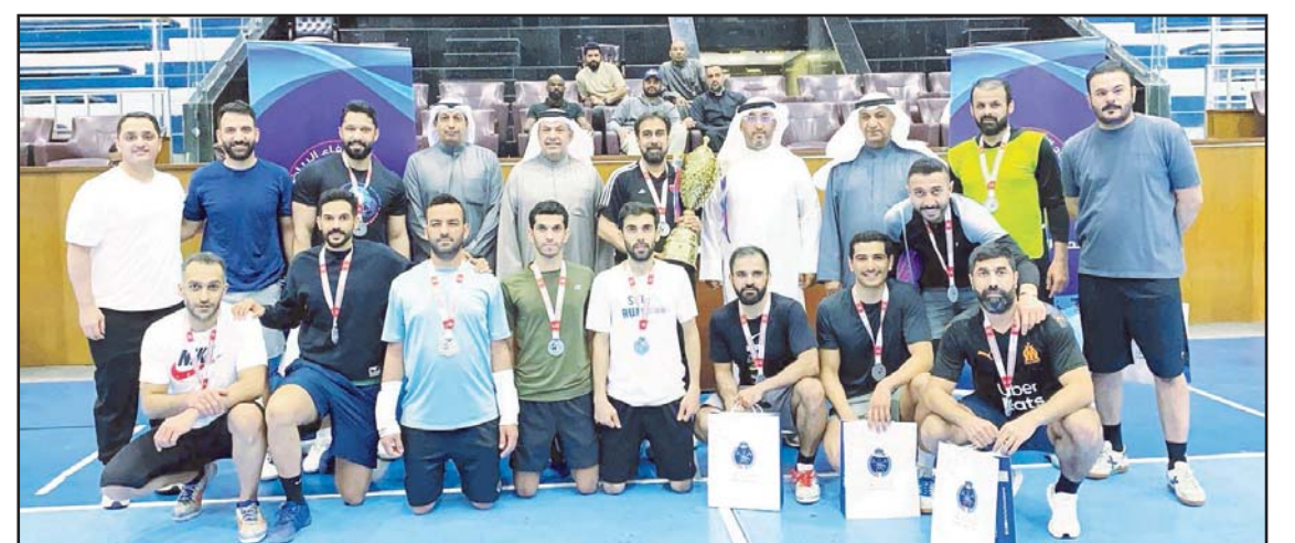
Group photo during the Ramadan Firefighters' Futsal Championship.

An analysis of the data reveals that the South Sabah Al-Ahmad project accounted for the largest share of distributed units, with other projects seeing varying numbers. While some years featured strong distribution figures; others faced considerable slowdowns, underscoring the ongoing challenges in the country's housing development efforts.