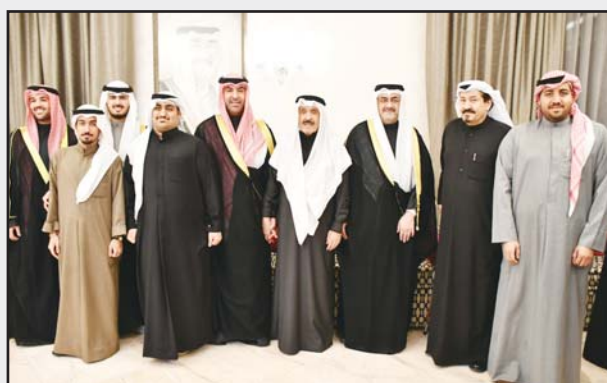
2 Sheikh Abdullah, Sheikh Mubarak greet well-wishers

Kuwait's Ministry of Foreign Affairs called on the international community, especially the Security Council, to intervene immediately and stop the violations of the Israeli occupation forces, allow the entry of humanitarian aid, and stop the policy of starvation and deprivation pursued by the occupation authorities. (KUNA)