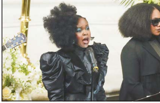
Lauryn Hill performs during a ceremony in celebration of Roberta Flack's life at The Abyssinian Baptist Church on Monday, March 10, in New York.

The church was decorated for the ceremony with stunning white and yellow bouquets. Seats filled quickly. At center, a