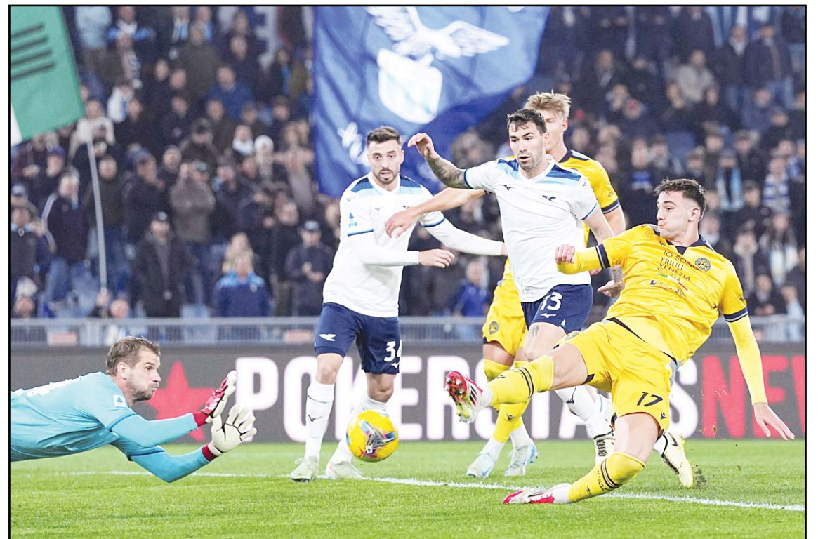
Lazio's goalkeeper Ivan Provedel, left, makes a save of a shot by Udinese's Lorenzo Lucca during the Serie A soccer match between Lazio and Udinese at the Rome's Olympic stadium, Italy.

The Barcelona-based side was 15th in the 20-team table, only two points clear of the relegation zone. Girona was 13th, five points above it.