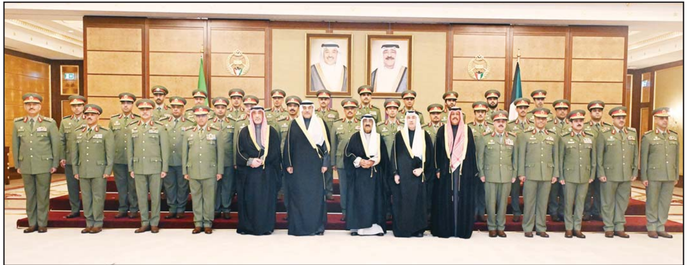
His Highness the Amir, the Supreme Commander of the Armed Forces, Sheikh Meshal Al-Ahmad Al-Jaber Al-Sabah during a visit to the Kuwait National Guard (KNG) headquarters.