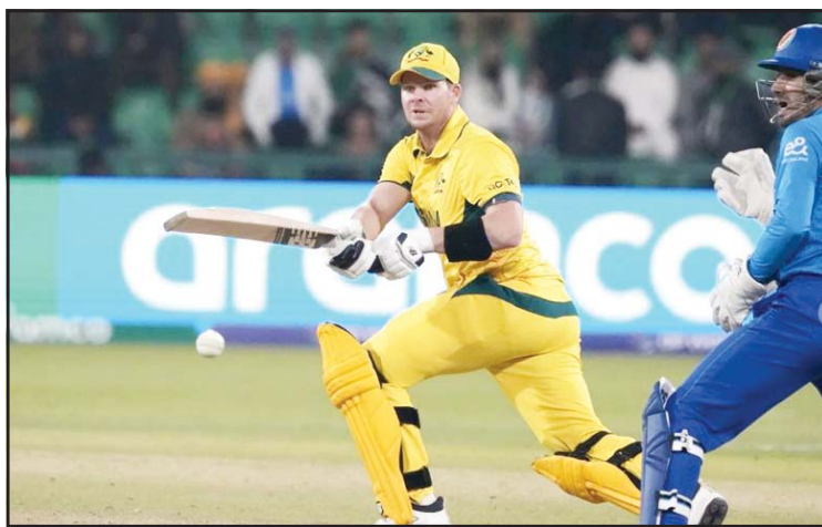
In this file photo, Australia's Steve Smith plays a shot during the ICC Champions Trophy cricket match between Australia and Afghanistan.

"The 150th-anniversary test at the MCG will be one of the great cricket events, and playing under lights will be a fantastic way to celebrate both our game's rich heritage and test cricket's modern evolution," Cricket Australia chief executive