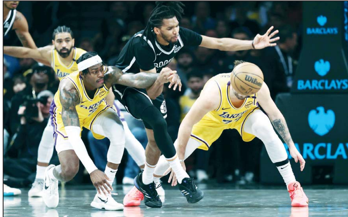
Los Angeles Lakers' Jarred Vanderbilt, front left, and Luka Doncic, right, and Brooklyn Nets' Ziaire Williams, center, chase the ball during the second half of an NBA basketball game in New York.

Nets 111, Lakers 108 In New York, Noah Clowney scored 19 points and Brooklyn beat Los Angeles in the Lakers' first game since losing LeBron James to a strained left groin.