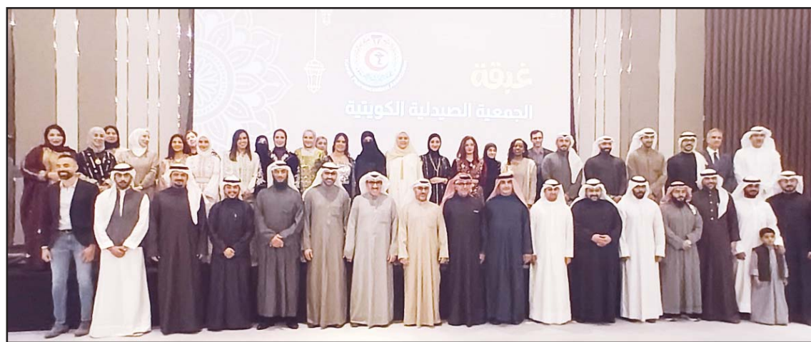
Minister of Health and Chairman of the Board of Directors of the Pharmaceutical Association with number of attendees.