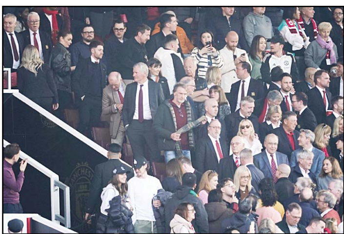
Manchester United co-owner Jim Ratcliffe, center, waits for the start of the English Premier League soccer match between Manchester United and Arsenal at Old Trafford stadium in Manchester, England.

Upon investing, Ratcliffe vowed to return the once-dominant club back to the summit of European soccer after more than a decade since it last won the Premier League.