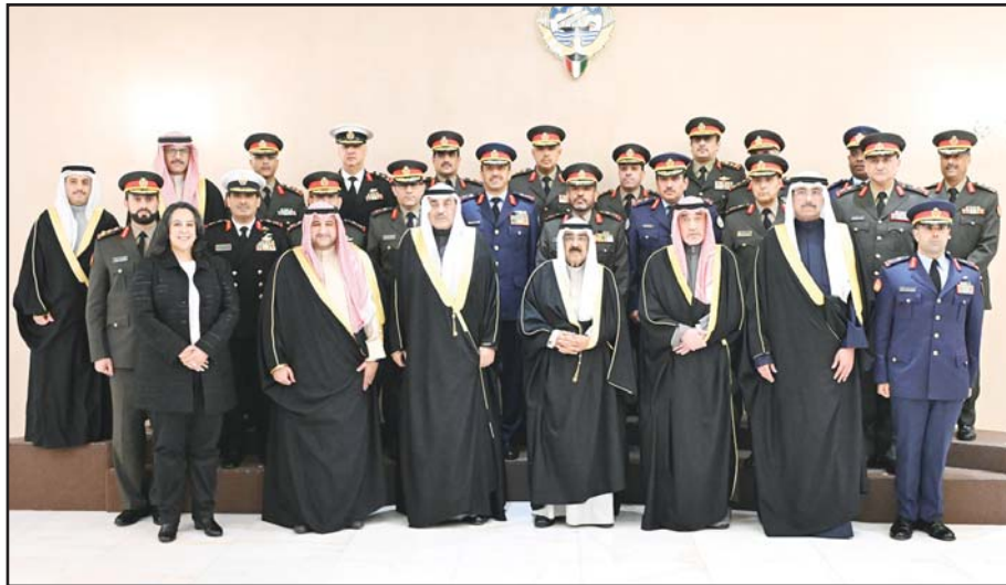
His Highness the Amir, the Supreme Commander of the Armed Forces, Sheikh Meshal Al-Ahmad Al-Jaber Al-Sabah during a visit to the headquarters of the Ministry of Defense.