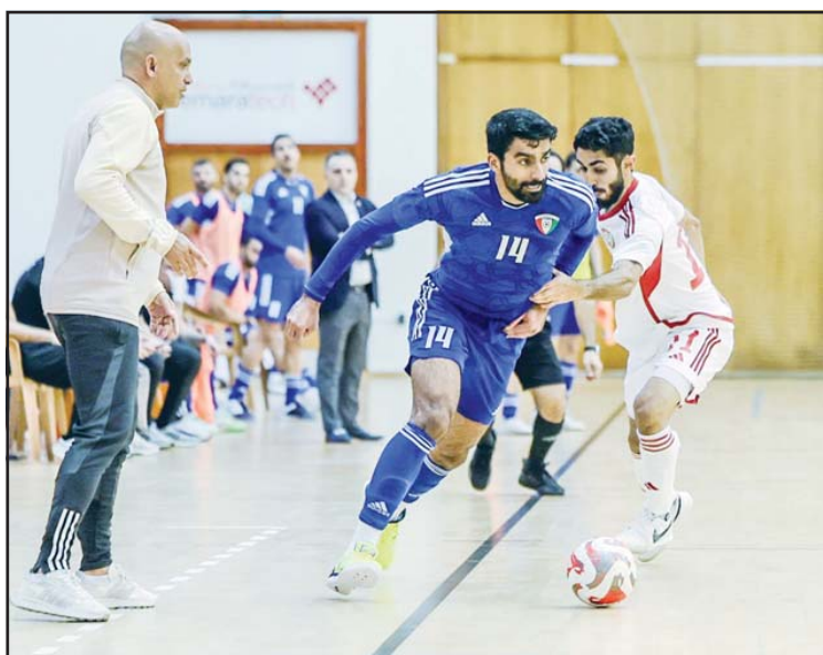
Kuwait and UAE players fighting for the ball during the friendly encounter.

DUBAI, March 11: The Kuwaiti futsal team secured a well-deserved 4-1 victory over UAE in a friendly match in Dubai, as both teams continue their preparations for upcoming competitions.