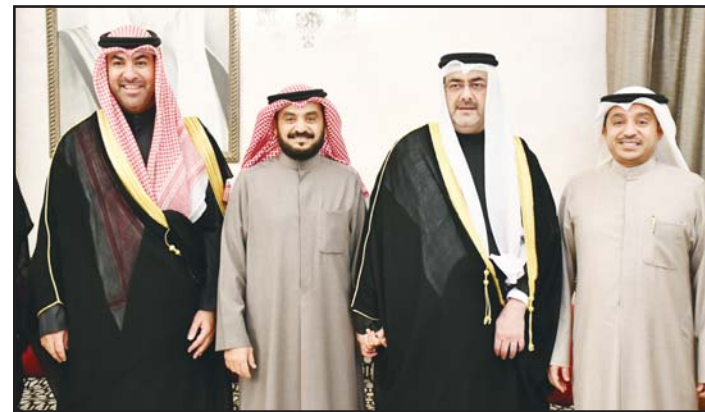
Top and above: Some pictures taken at the event.