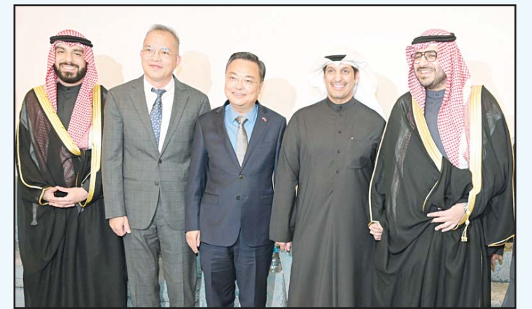
Minister Al-Mutairi warmly welcomes well-wishers at Al-Ghanayem Ramadan gathering.