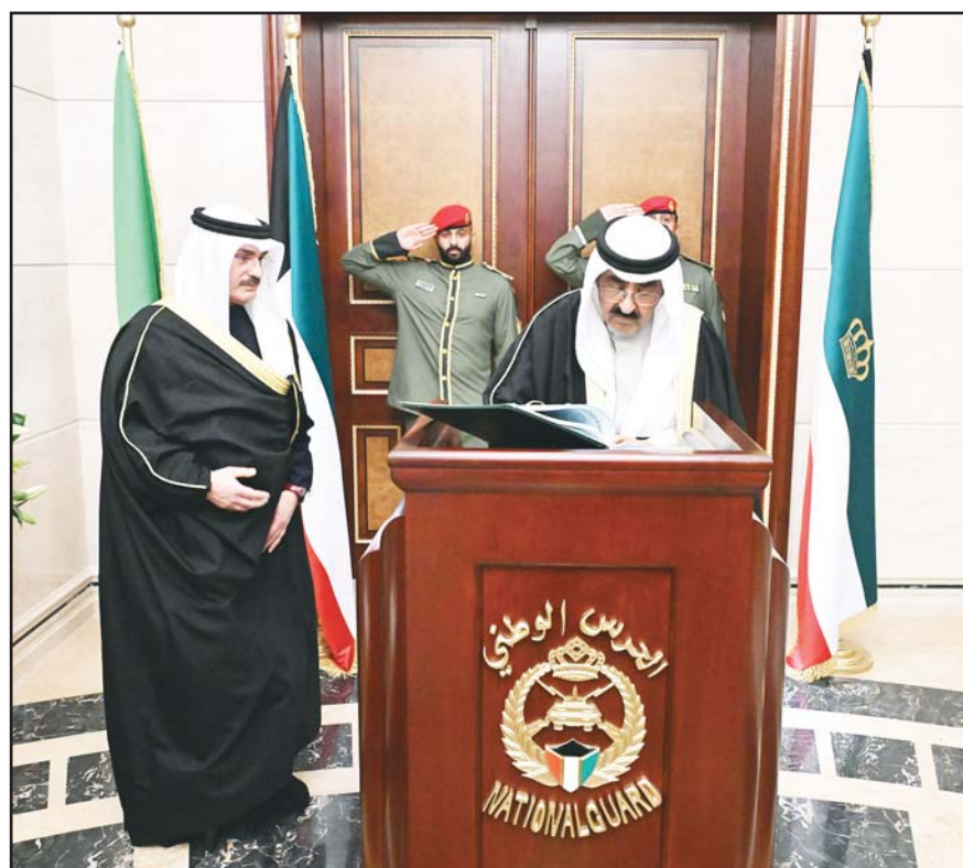
His Highness the Amir signs the registry of honor during a visit to the Kuwait National Guard (KNG) headquarters.

KUWAIT CITY, March 11, (KUNA): His Highness the Amir, the Supreme Commander of the Armed Forces, Sheikh Meshal Al-Ahmad Al-Jaber Al-Sabah paid a visit on Monday to the headquarters of the Ministry of Defense.