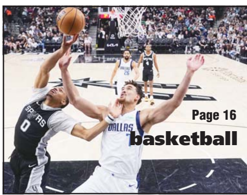
Page 16 basketball