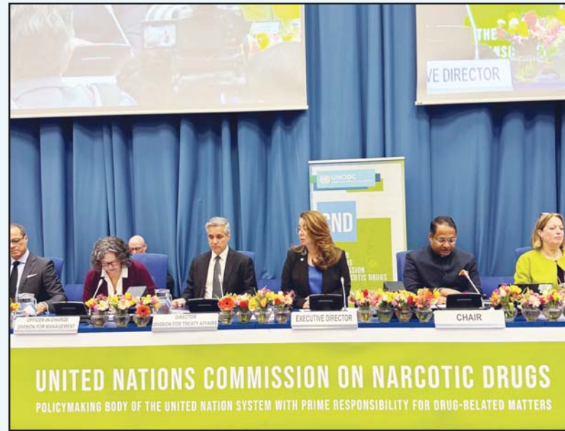
The 68th session of the United Nations Commission on Narcotics under way.