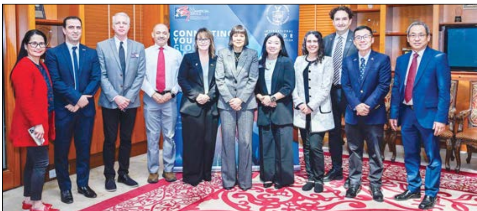
US universities network with Kuwaiti educators at AmCham event.

We were thrilled to host such a valuable event for students and educational professionals in Kuwait to explore the academic offerings and opportuni-