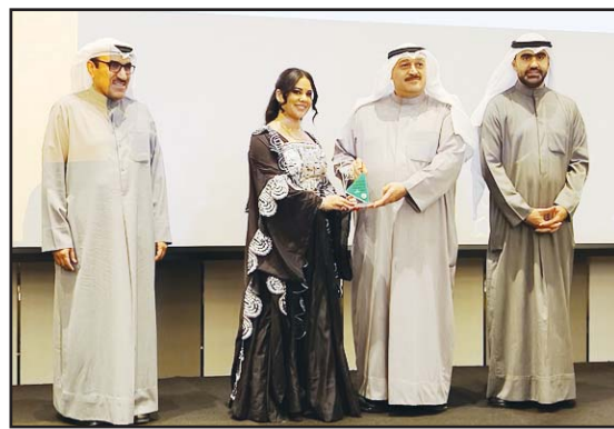
Minister of Health and Chairman of the Board of Directors of the Pharmaceutical Association during the award ceremony.

ments. He affirmed the ministry's commitment to enhancing the role of professional pharmacists and ensuring they