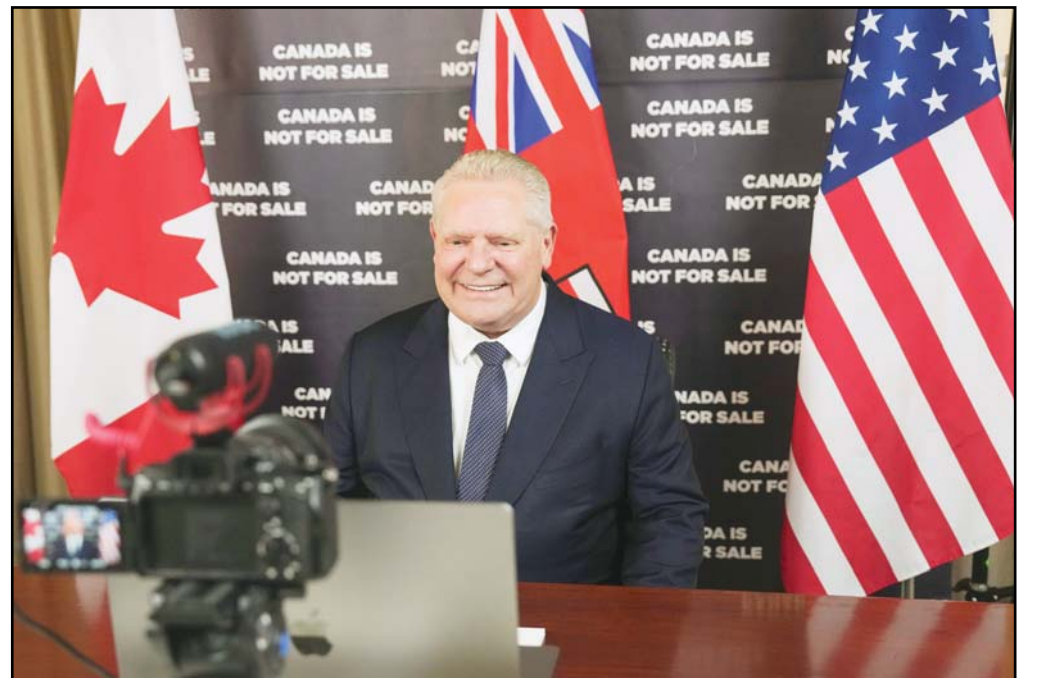
Ontario Premier Doug Ford prepares to speak to an American news outlet in his office at the Queens Park Legislature in Toronto on Monday, March 10, 2025.

"They were very clear that it's not Minnesota -- we're huge trading partners."