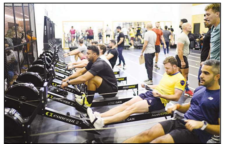
Left-right: The exhilarating fitness challenge in progress.

clusive workplace to deliver exceptional customer service while contributing sustainably to the community. Through its extensive branch network and innovative digital services, the Bank empowers customers to conduct banking transactions conveniently and efficiently, ensuring a seamless experience.