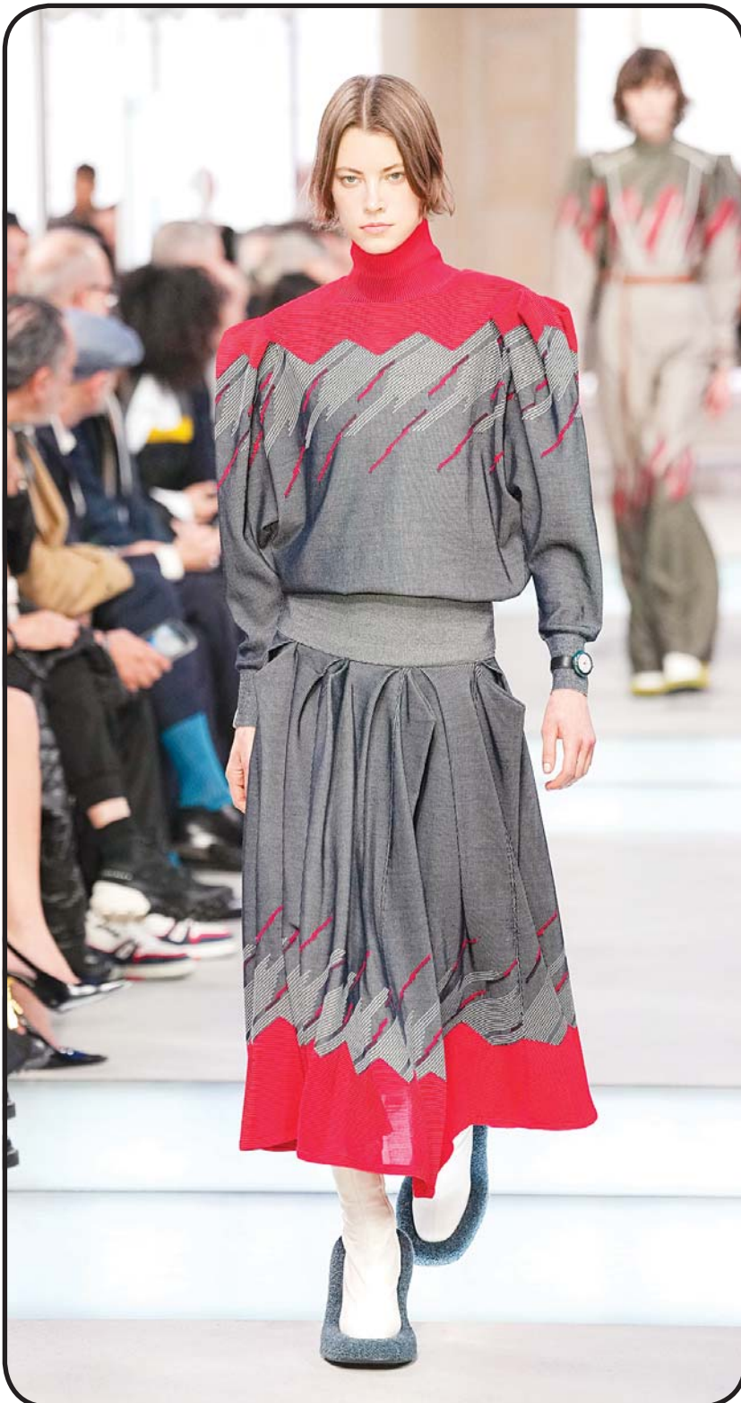
A model wears a creation as part of the Louis Vuitton Fall/Winter 2025-2026 Womenswear collection presented in Paris, Monday, March 10.