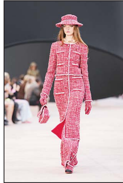
A model presents a creation as part of the Chanel Fall/Winter 2025-2026 Womenswear collection.