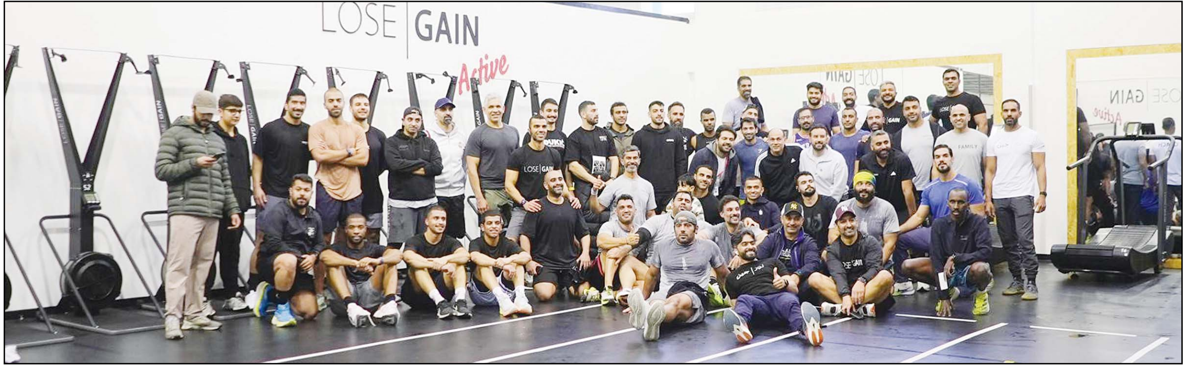
Participants of the fitness challenge at Lose Gain.

Fitness is a key element of a healthy lifestyle, especially during Ramadan