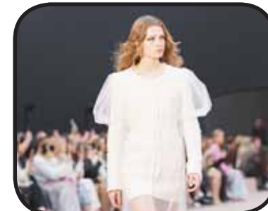
A model wears a creation by Chanel.