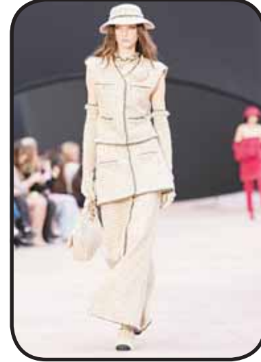
A model wears a creation from Chanel's 2025-2026 collection.