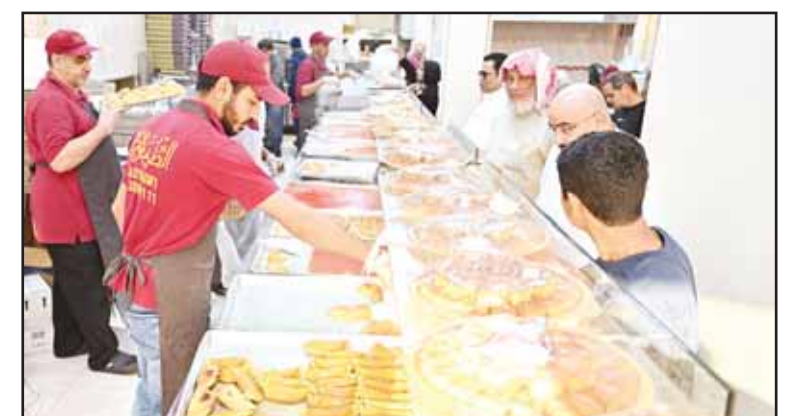
People shop for traditional desserts at a restaurant during the Islamic holy month of Ramadan in Hawalli Governorate, Kuwait, on March 9, 2025.

In a letter, the Funeral Affairs Department stated that some funeral directors have misinterpreted the previous 'fatwa'; leading to the widespread use of pebbles in various colors and sizes, which falls outside the intended legal framework. It stressed the need for a clear legal 'fatwa' to specify a uniform color (such as white or gray) and an appropriate small size for pebbles, in order to prevent expansion of this practice, which could lead to the innovation of new religious practices and the construction of overly ornate graves in various shapes and colors.