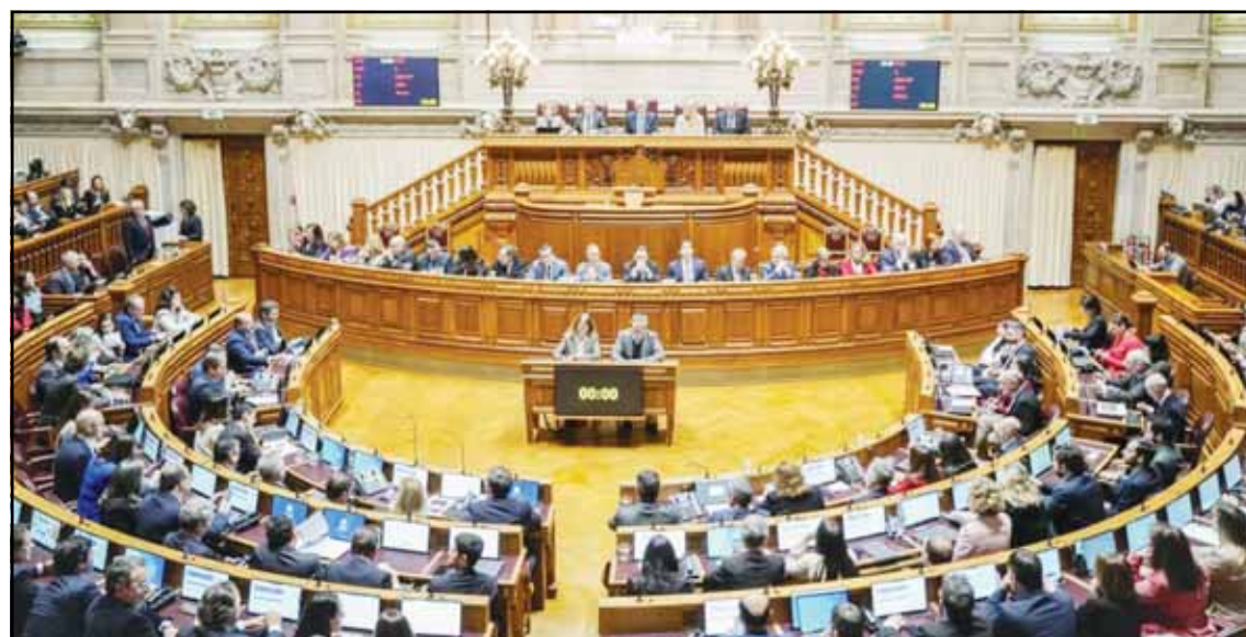
Members of the Portuguese parliament take their seats at the start of a debate preceding the vote on a confidence motion concerning Portuguese Prime Minister Luis Montenegro in Lisbon on March 11.

Gottfried's 40-point margin of victory exceeded Johnson's 30-point win in November. Democratic presidential nominee Kamala Harris carried the district with 68% of the vote over President Donald Trump, the Republican nominee.