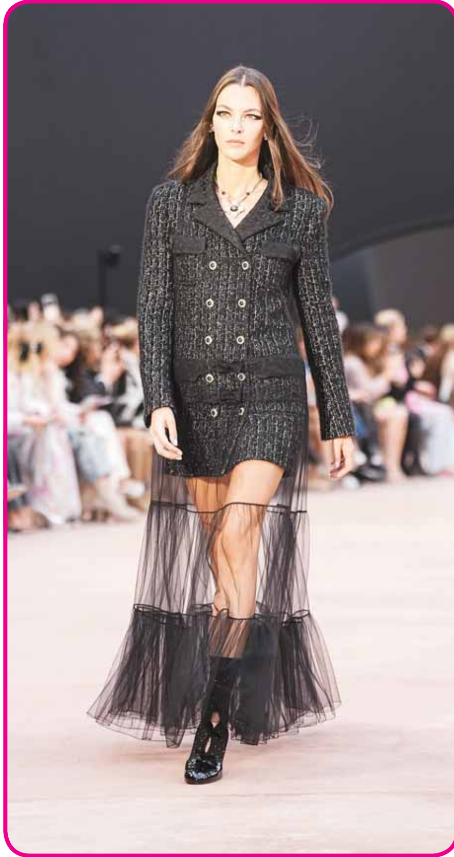
Vittoria Ceretti wears a creation as part of the Chanel Fall/Winter 2025-2026 Womenswear collection presented Tuesday, March 11, in Paris.