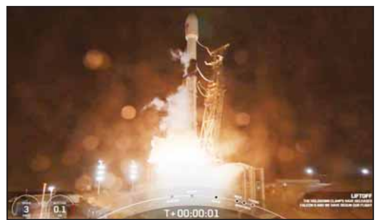
In this image from video provided by SpaceX, the company's SpaceX's Falcon rocket, carrying NASA's newest space telescope, Spherex, lifts off from Vandenberg Space Force Base, Calif., Tuesday, March 11.

Spherex won't see galaxies in exquisite detail like NASA's larger and more elaborate Hubble and Webb space telescopes, with their narrow