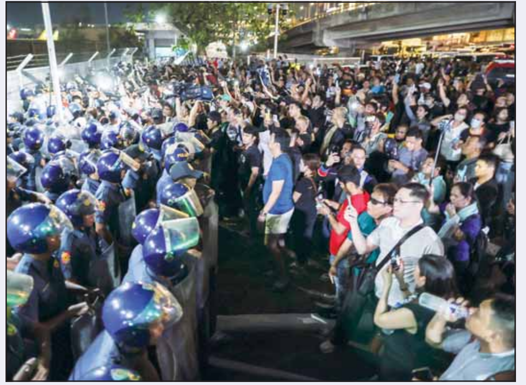
Supporters of former President Rodrigo Duterte rush to the fence of the Villamor Air Base in Manila, Philippines on March 11, upon learning that the plane taking the ex-president to The Hague has left the airport.

Within days of being taken into custody at the court's detention center, Duterte will be taken to court for a hearing. Judges will confirm his identity, check that he understands the charges against him and set a date for a hearing known as a confirmation of charges at which a panel of pretrial judges will assess if prosecutors have sufficient evidence to merit sending him to a full trial.