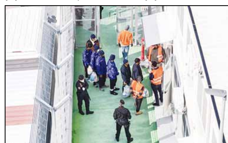
An aerial photograph taken by a drone shows migrants entering a detention center for processing following earlier court rejections, in the port of Shengjin, northwestern Albania on Jan 28.

The "return hubs," a euphemism for deportation centers, would apply only to people whose asylum requests have been rejected and exclude unaccompanied minors, Brunner said. He added that any future deal would have to include safeguards to ensure international law and human rights are respected.