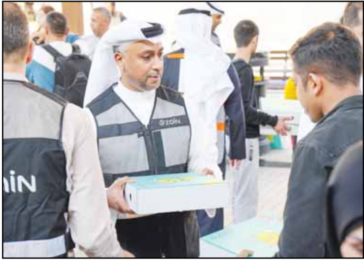
The Zain Al-Shuhoor volunteer team actively participates in the company's Ramadan initiatives.