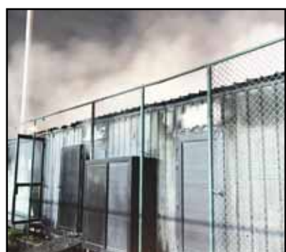
Smoke from the rooms.