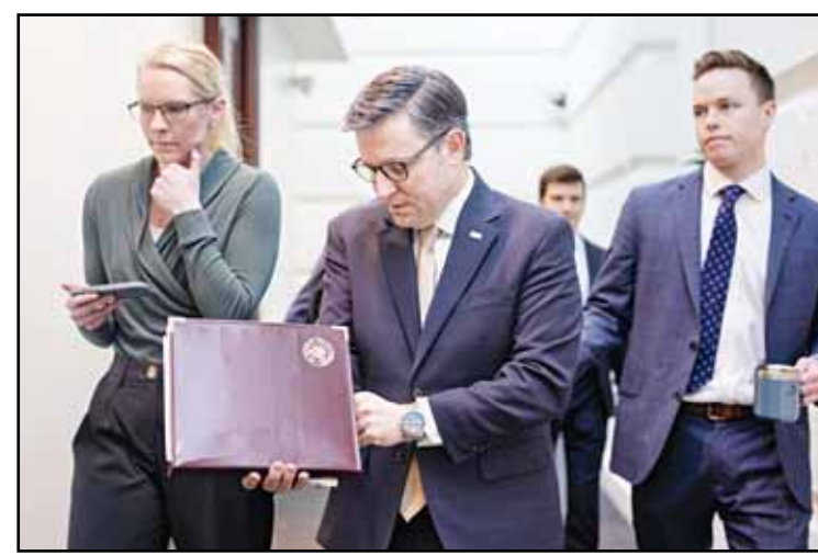
US Speaker of the House Mike Johnson, arrives for a closed-door meeting as House Republicans push ahead with a go-it-alone strategy on an interim GOP spending bill that would keep federal agencies funded through Sept 30 despite key Republican holdouts and united opposition from Democrats, at the Capitol, in Washington, March 11.

Johnson's strategy had the backing of Trump, who called on Republicans to "remain UNITED - NO DISSIDENT -