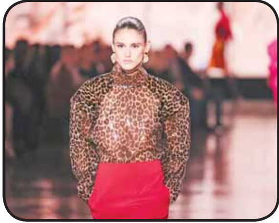
A model wears a creation as part of the Saint Laurent collection.