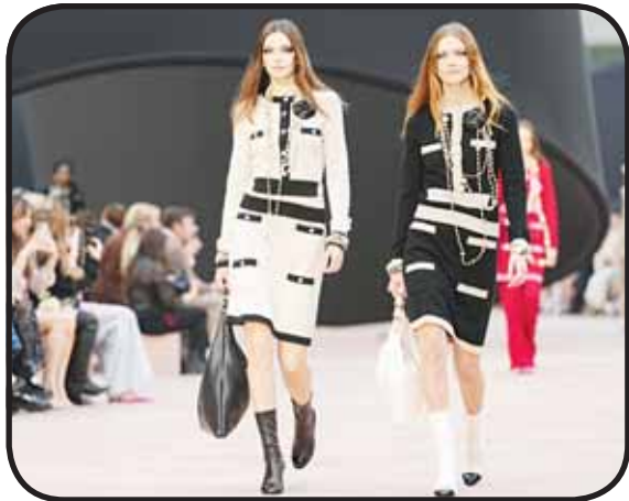
Models wear creations by Chanel.