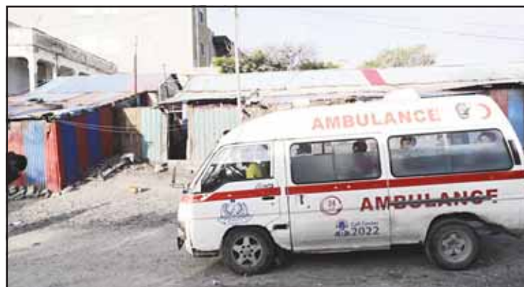
An ambulance is seen on the beach following an attack on Mogadishu, Somalia on Aug 3, 2024.

Estimates of the death toll from the attack varied. One local resident, Muh-sin Abdullahi, said six people, including two well-known traditional elders, were killed. But witness Hussein Jeelle Raage said three of his family members were among at least 11 people he knew were dead. Footage shared on social media showed thick smoke rising from the hotel, with significant destruction to the building.