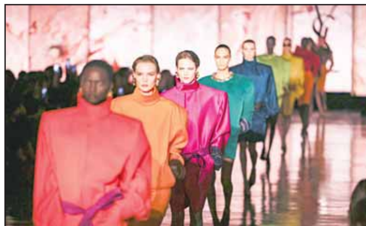
Models wear creations as part of the Saint Laurent Fall/Winter 2025-2026 Womenswear collection presented Tuesday, March 11, in Paris.

Other performances that have been exclusively shown on the Vision Pro includes Alicia Keys and Raye. The Weekend also had his immersive music experience called "The Weeknd: Open Hearts."