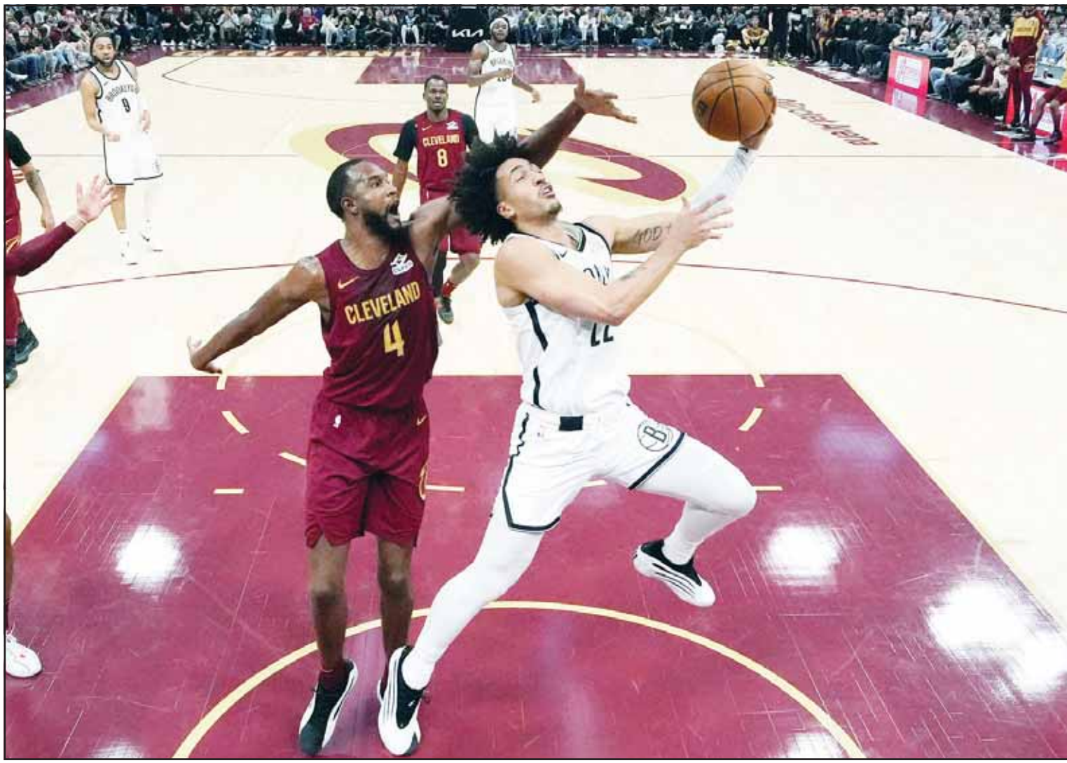
Brooklyn Nets forward Jalen Wilson (22) goes to the basket in front of Cleveland Cavaliers forward Evan Mobley (4) in the first half of an NBA basketball game in Cleveland.