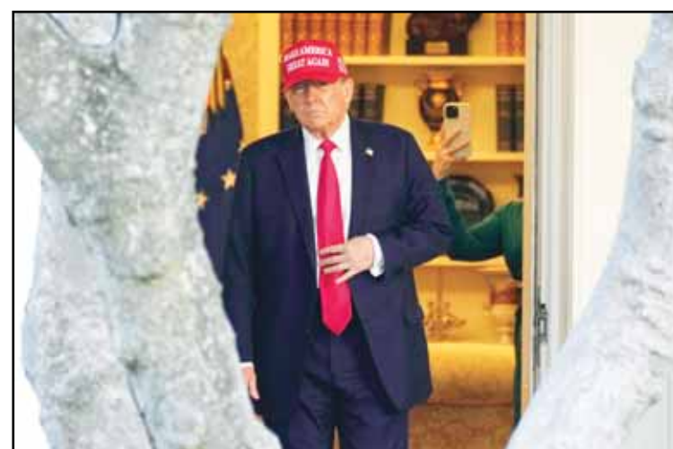
US President Donald Trump walks from the Oval Office to depart on Marine One on the South Lawn of the White House in Washington, Feb. 28, 2025.

Trump told CEOs in the Business Roundtable on Tuesday that the tar-