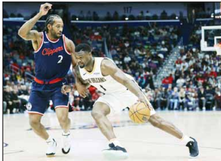
New Orleans Pelicans forward Zion Williamson (1) attempts to drive past Los Angeles Clippers forward Kawhi Leonard (2) in the second half of an NBA basketball game in New Orleans.

Haliburton, who had missed the last three games with a hip injury, finished with 14 points and 10 assists. Pascal Siakam led Indiana with 25 points and 12 rebounds, and Bennedict Mahturin added 17 points.