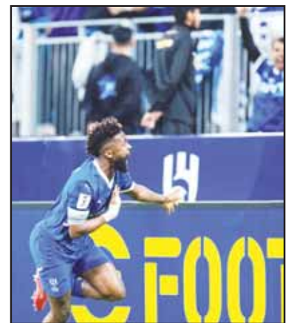
Al-Hilal player celebrates after scoring against Pakhtakor.

position with a 3-1 victory in the first leg in Doha, ensuring its advancement with a 5-1 aggregate win.