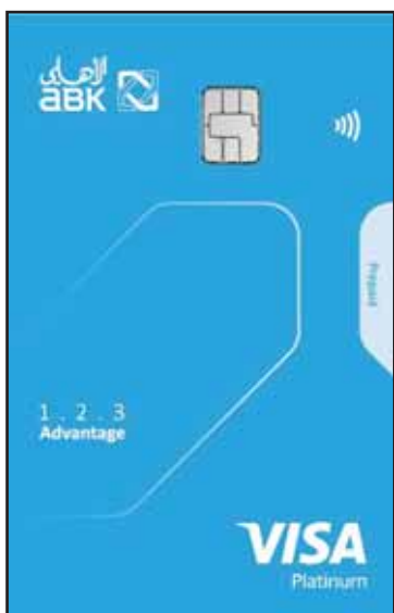
ABK Visa Platinum 1.2.3

and Dubai International Financial Centre (DIFC) in the United Arab Emirates, servicing both Kuwaiti and Emirati individual and corporate clients.