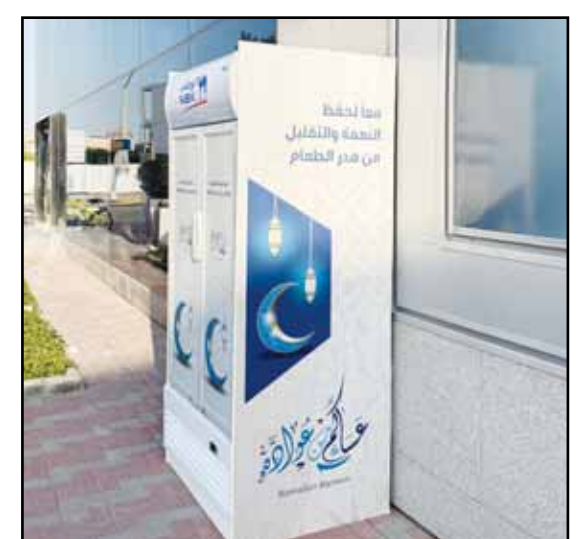
NBK installs refrigerators at branches to provide iftar meals.

Through this initiative, NBK aims to inspire the community to take active steps toward reducing food waste, reinforcing its broader efforts to support environmental sustainability and social well-being.