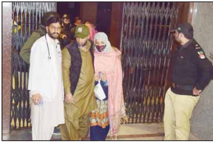
Passengers rescued by security forces from a passenger train attacked by insurgents arrive at a railway station in Quetta, Pakistan on March 12.

Authorities said the rescued so far include women and children. An undisclosed number of security personnel have been killed, according to the three security officials. They spoke on condition of anonymity as they were not authorized to speak to the media.