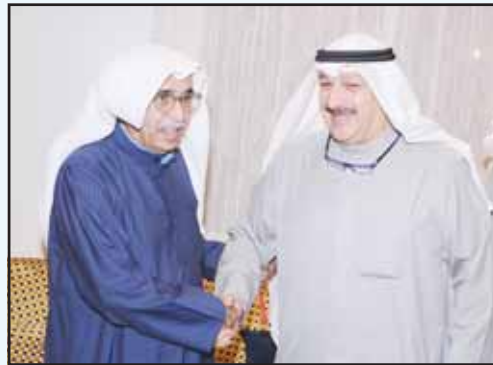
Top and above: Some pictures taken at the gathering.