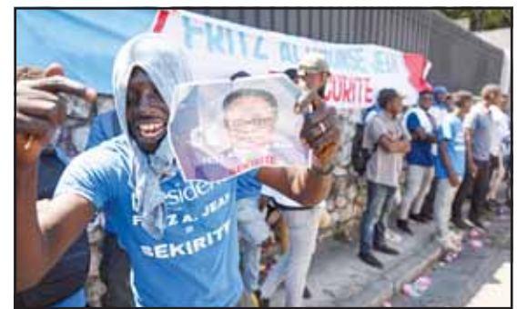
Supporters celebrate the installation of Fritz Alphonse Jean, an economist and former central bank governor, who replaces Leslie Voltaire in the rotating presidency of the transitional presidential council, in Port-au-Prince, Haiti on March 7. (AP)

UNITED NATIONS, March 12, (AP): The United States on Tuesday extended its ban on flights to Haiti's capital until Sept 8 because of escalating gang violence, which the UN's human rights expert on the Caribbean nation said is more dire than ever. The Federal Aviation Administration's announcement extends a ban on US flights to Port-au-Prince that began in November after gangs opened fire on three commercial planes. The initial ban was set to expire on Wednesday.