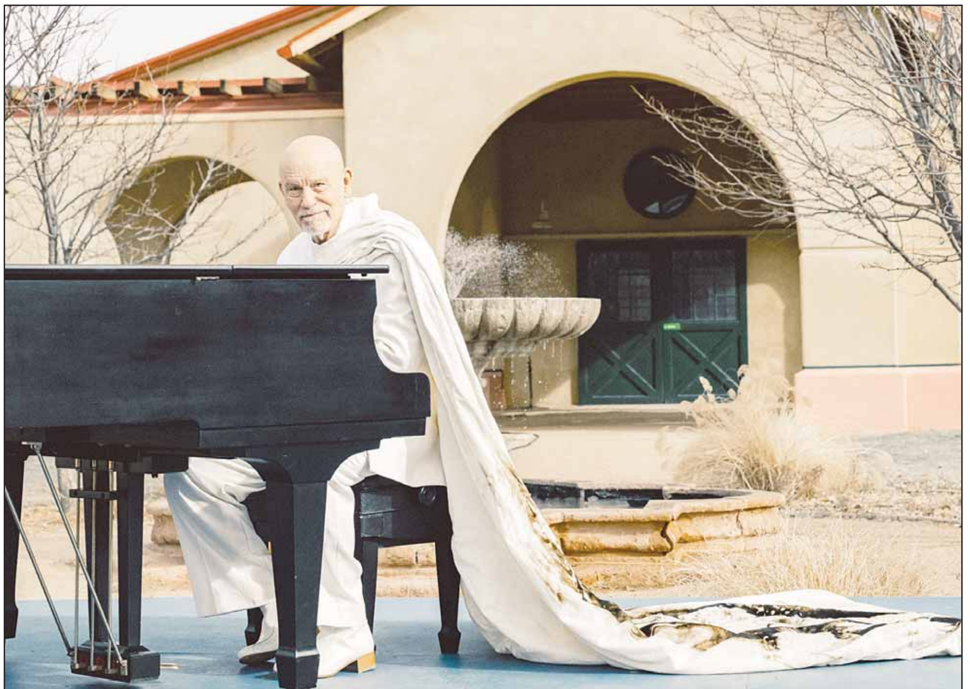
This image released by A24 shows John Malkovich in a scene from 'Opus.'