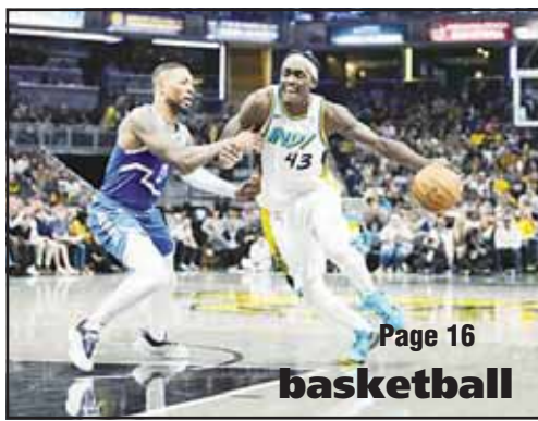
Page 16 basketball