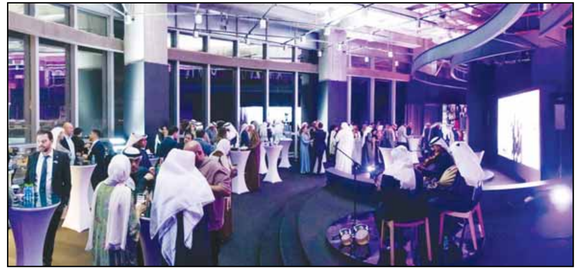
A large turnout of entrepreneurs during the 'weyak' Ghabga.