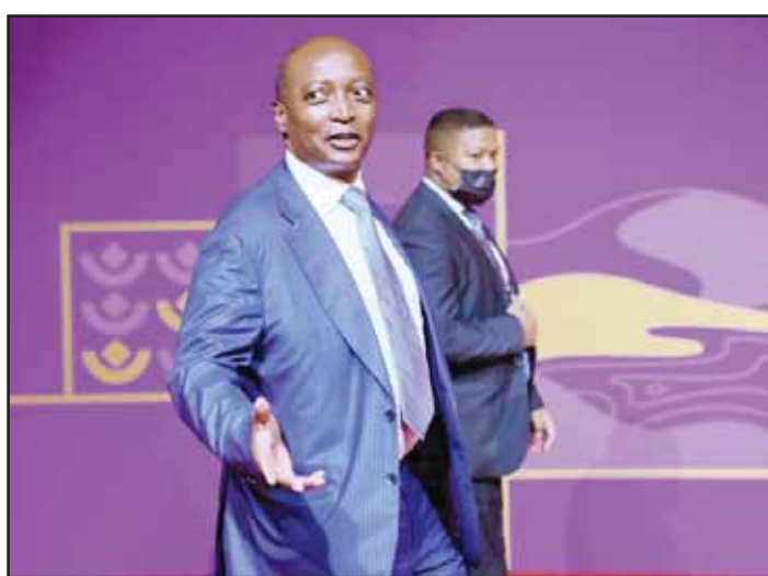
In this file photo, Patrice Motsepe, the President of the Confederation of African Football, arrives for the 2022 soccer World Cup draw at the Doha Exhibition and Convention Center in Doha, Qatar.

Motsepe referred Wednesday to his talks with other heads of Afri-