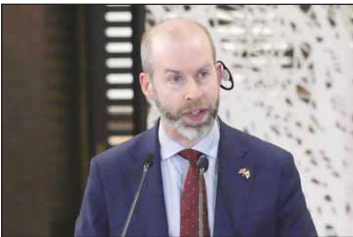
Britain's Secretary of State for Business and Trade Jonathan Reynolds speaks during an announcement at Iikura Guest House on March 7, 2025, in Tokyo.

Trade body UK Steel said that in 2024, Britain exported 180,000 metric tons (198,000 U.S. tons) of steel to the United States, about 7% of the U.K.'s total steel exports by volume and 9% by value. The aluminum industry says the U.S. market accounts for 10% of U.K. exports.