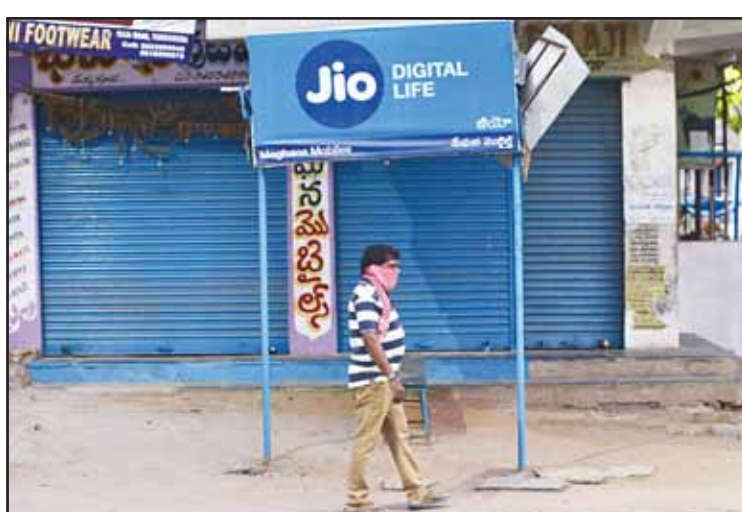
A man walks past a Reliance Jio signage in front of a closed shop in Hyderabad, India, April 22, 2020.

A statement from Jio said Starlink will complement the Indian telecom giant's broadband services "by extending