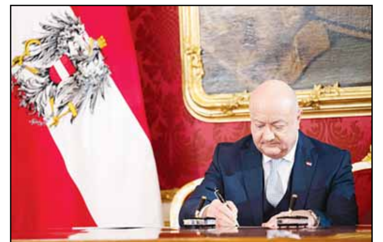
Chancellor Christian Stocker signs papers during the swearing-in ceremony of the Federal Government in the presidential office at the Hofburg Palace, in Vienna, Austria on March 3.

Migrants who are still in the asylum process or have received a deportation