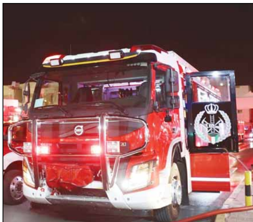
KFF at the site.

■ The state is obligated to employ 25,000 citizens in the future. A portion of this workforce is meant to work in the private sector. Have we prepared the private sector for this?