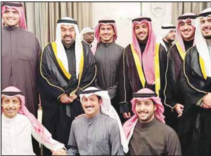
A group photo taken from the event.

He added "may Allah bless Kuwait, its wise leadership and its loyal people with continued security, safety and stability under the guidance of His Highness the Amir Sheikh Meshal Al-Ahmad Al-Jaber Al-Sabah, His Highness the Crown Prince Sheikh Sabah Al-Khalid Al-Hamad Al-Sabah and His Highness the Prime Minister Sheikh Ahmad Al-Abdullah Al-Ahmad Al-Sabah."