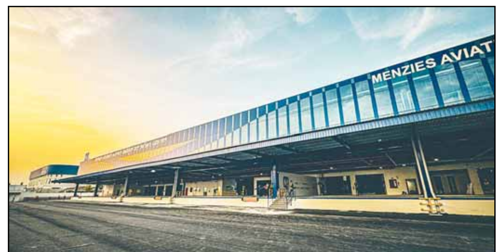
Menzies aviation's new Greenfield Cargo Terminal in Bengaluru.