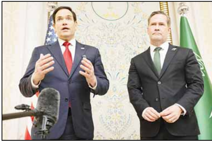
US Secretary of State Marco Rubio, (left), and US National Security Advisor Mike Waltz speak with the media following meetings with a Ukrainian delegation in Jeddah, Saudi Arabia on March 11.

Meanwhile, an intensifying Russian effort to push Ukrainian forces out of its Kursk region has yielded breakthroughs in recent days, Ukrainian soldiers told The Associated Press. The fighting has escalated as ceasefire talks come to a head, with Moscow intent on taking back its territory and Kyiv determined to hold onto it as a bargaining chip in any negotiations.