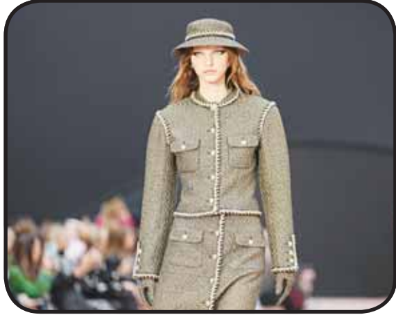
A model wears a creation as part of the Chanel Fall/Winter 2025-2026 Womenswear collection.