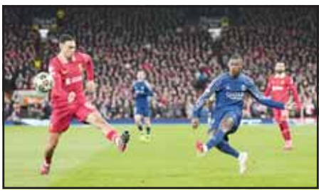
PSG's Nuno Mendes sends a cross by Liverpool's Trent Alexander-Arnold during the Champions League round of 16 second leg soccer match between Liverpool and Paris Saint-Germain at Anfield in Liverpool, England.