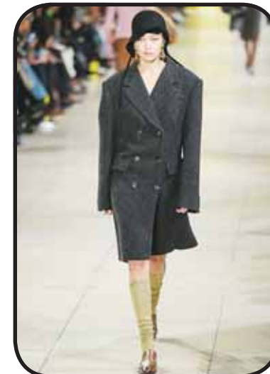
Gigi Hadid wears a creation as part of the Miu Miu 2025-2025 collection.