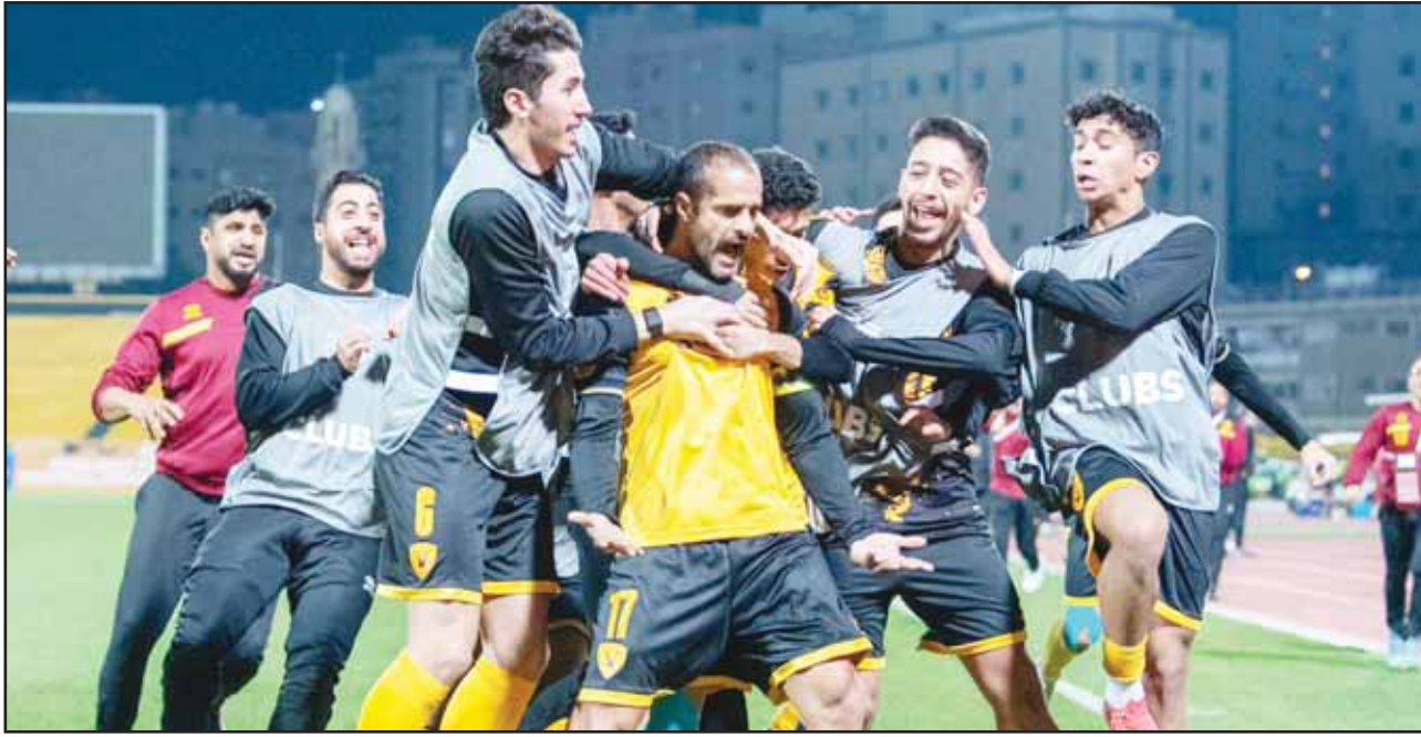
Al-Qadsiya players led by Al-Mutawa celebrate after qualifying for the final.