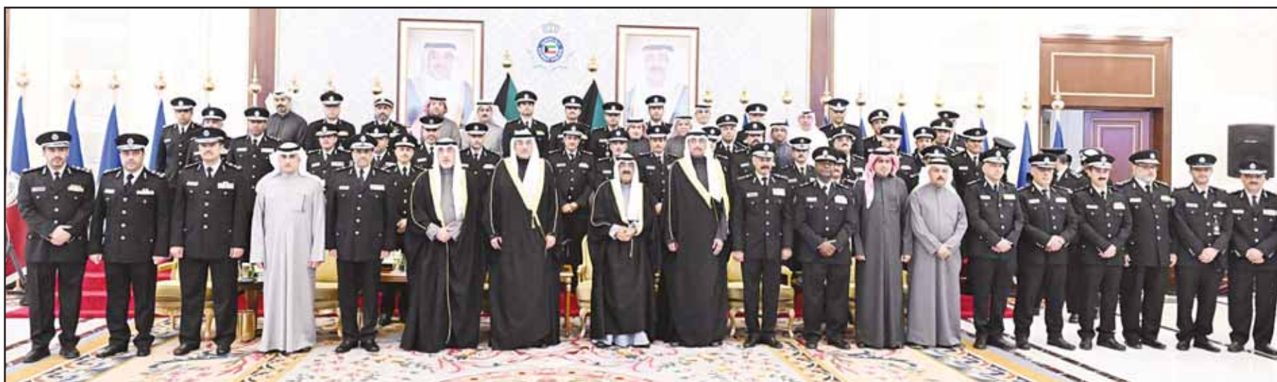
His Highness the Amir, the Supreme Commander of the Armed Forces, Sheikh Meshal Al-Ahmad Al-Jaber Al-Sabah visits the Headquarters of the Ministry of Interior on Tuesday.