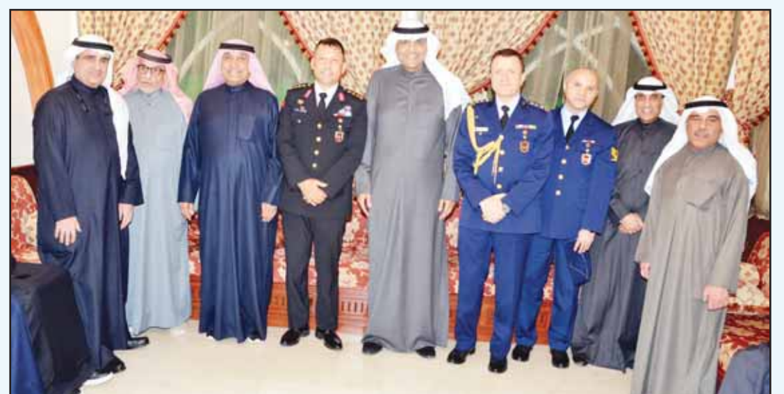
Al-Barjas Family welcomes public figures and diplomats at diwaniya.