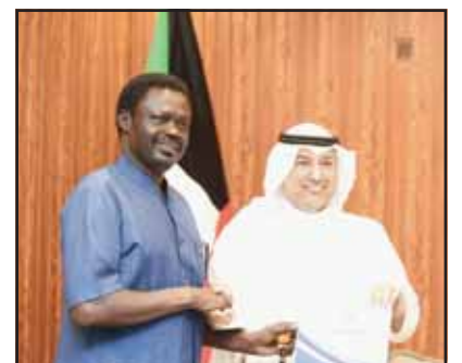
The Governor of Darfur Region delivers a letter of thanks and appreciation to the Kuwaiti Ambassador for the State of Kuwait's provision of humanitarian aid.

tions experienced by the people of Darfur and the displaced in the camps since May 2024, especially in Zamzam camp, which hosts millions of people displaced by the siege imposed on the city of El Fasher in North Darfur State.