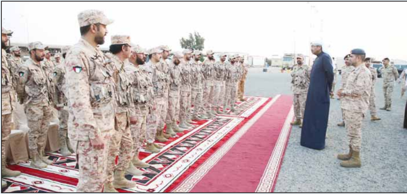
The Minister of Defense and Acting Minister of Interior, Sheikh Abdullah Ali Abdullah Al-Sabah addresses the unit during his visit to the 'Mubarak Duty' force.