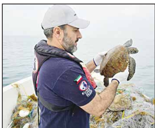
The diving team rescues a rare turtle trapped in a net.

Al-Fadhel expressed gratitude for the efforts of the government, as well as scientific, research, and environmental institutions in the country, for their commitment to sea turtle conservation. These efforts include monitoring their movements locally and throughout the Gulf using satellite tracking devices, as well as adhering to international agreements and treaties to protect turtles.