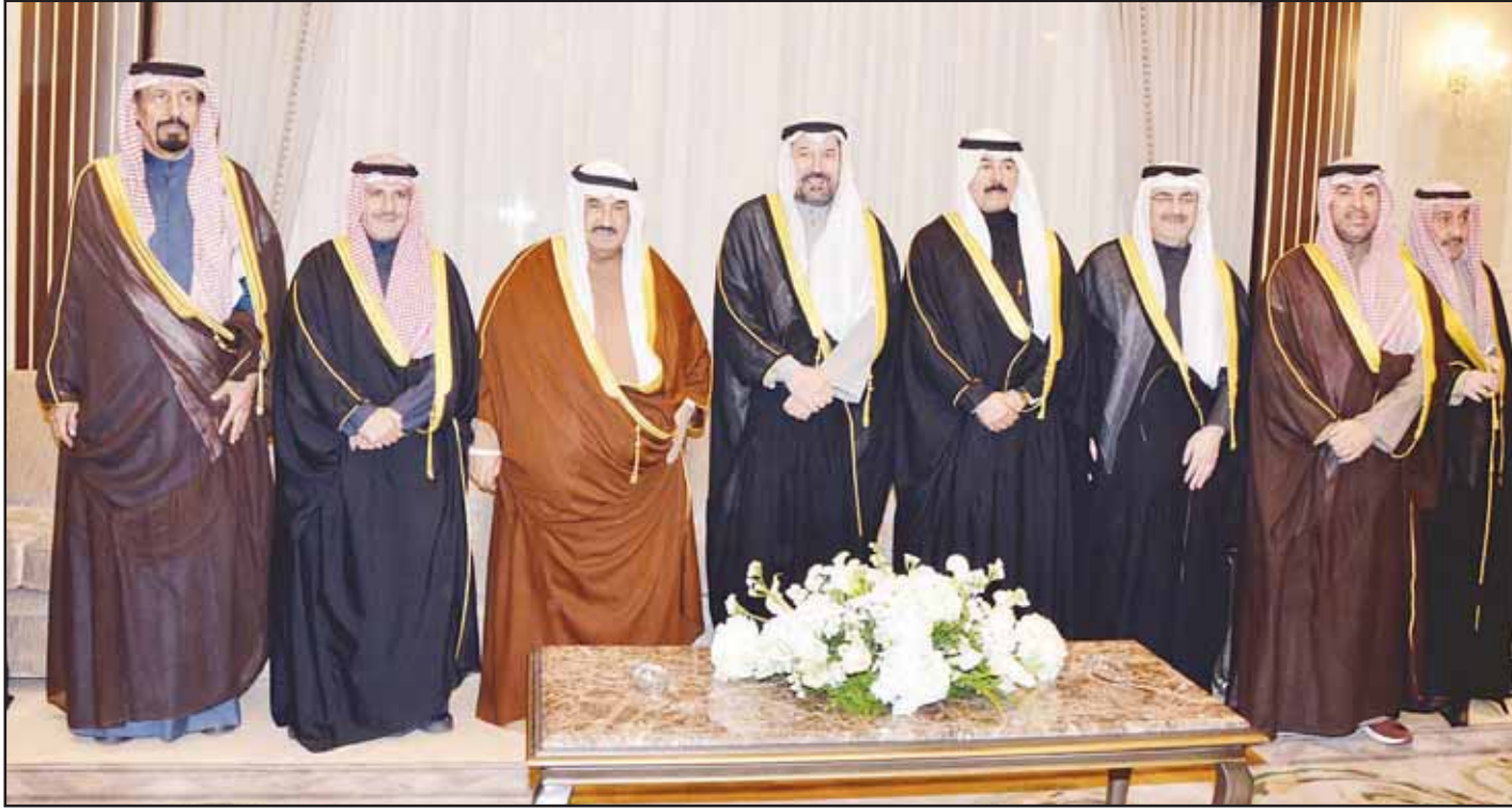
His Highness Sheikh Nasser Al-Mohammad and other members of royal family.