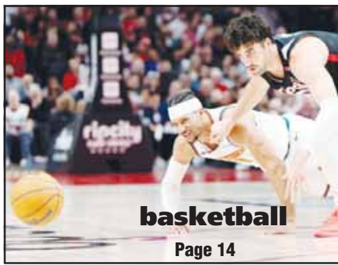
basketball Page 14