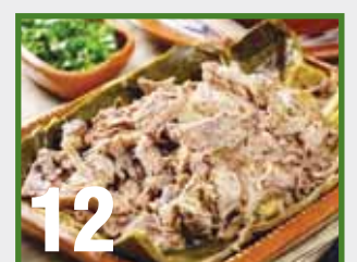
12 Savor the Flavor of Mexico: Traditional Barbacoa Recipe