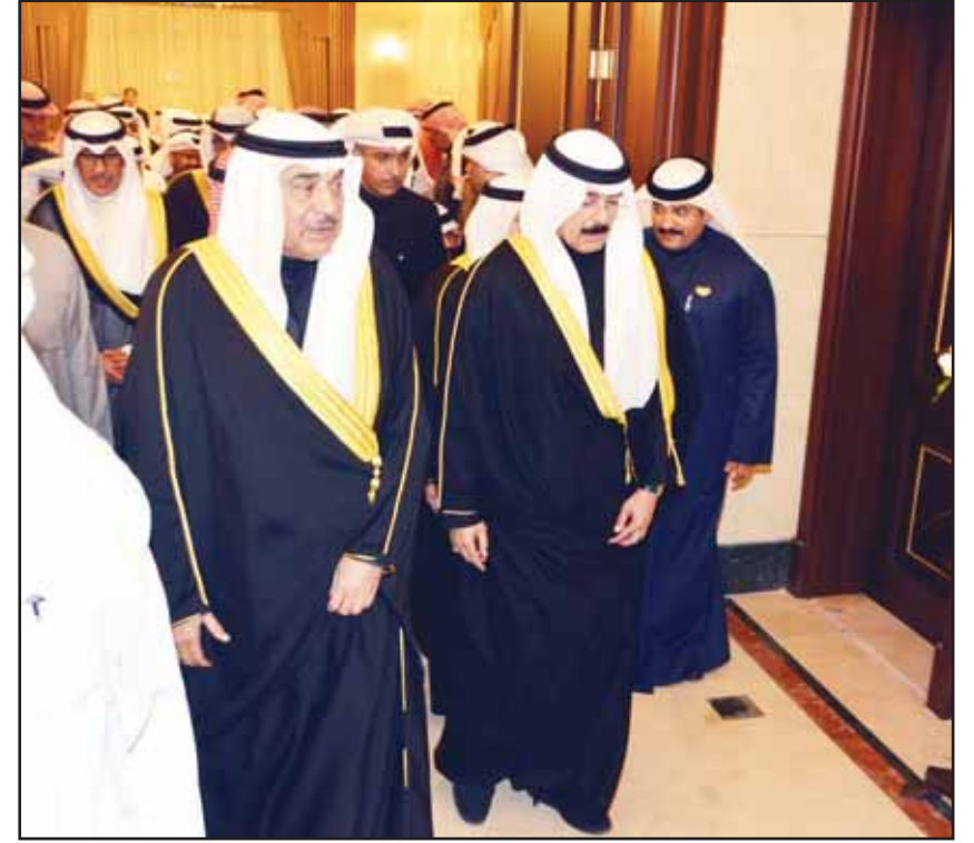
His Highness the Crown Prince Sheikh Sabah Al-Khalid Al-Sabah arrives.