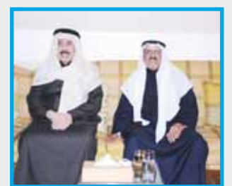
5 Crown Prince marks Ramadan with visit to Jabriya Diwaniya