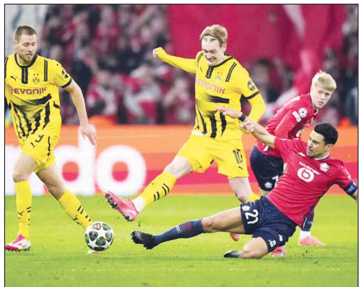
Lille's Benjamin Andre tackles Dortmund's Julian Brandt during the Champions League round of 16 second leg soccer match between Lille and Borussia Dortmund in Villeneuve-d'Ascq.

"I won't surf on a hype wave, no chance. My focus is absolutely on the Union Berlin game on Saturday and nothing is won until it's won." - Bayern coach Vincent Kompany.