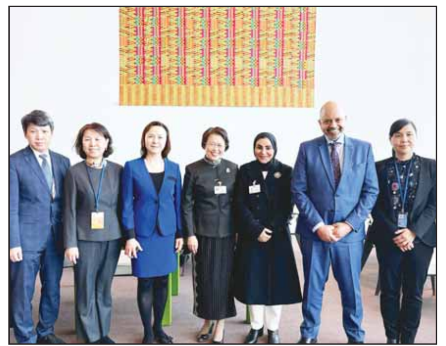
Minister of Social Affairs, Family Affairs and Childhood Dr. Amthal Al-Huwailah with Chinese officials.

It is worth noting that the Municipality has implemented a comprehensive plan throughout the season to raise awareness among spring camp owners.