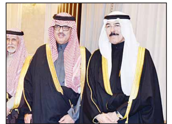
Saudi ambassador extends greetings.