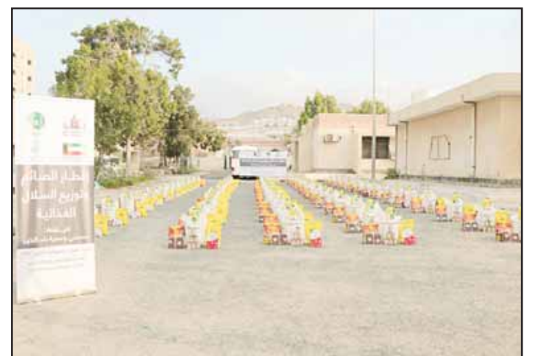
Food parcels distributed to displaced families in the Yemeni regions of Maarib and Hadramut as part of the 10-year 'Kuwait on your side' humanitarian campaign.