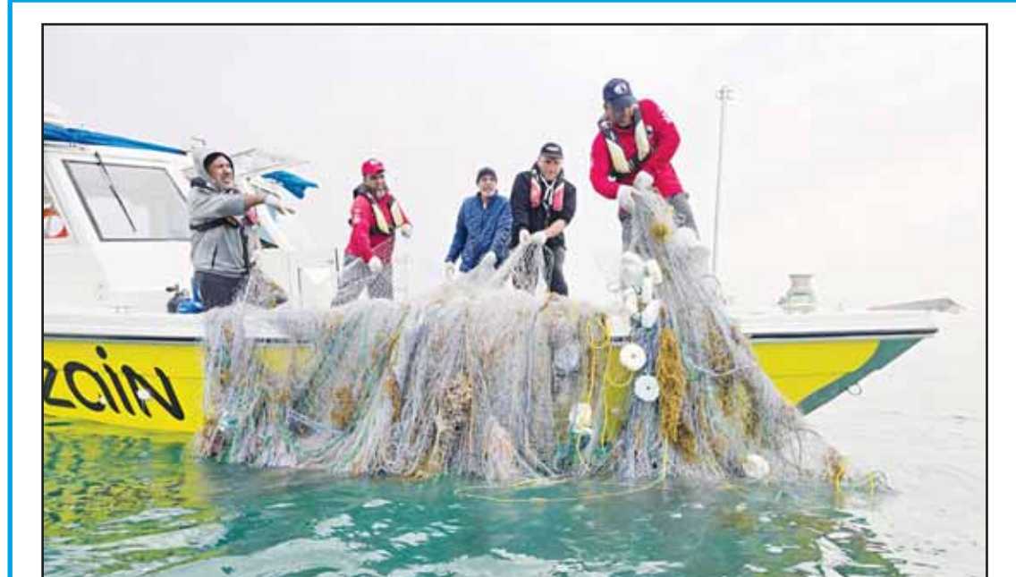
The Kuwaiti diving team removes abandoned fishing nets in Bnaider.