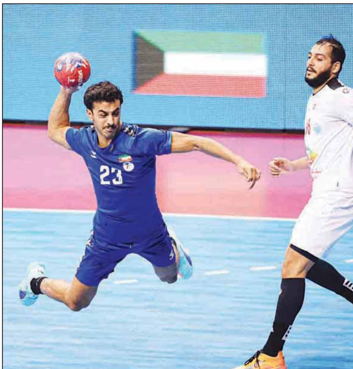
A file photo of players in action.