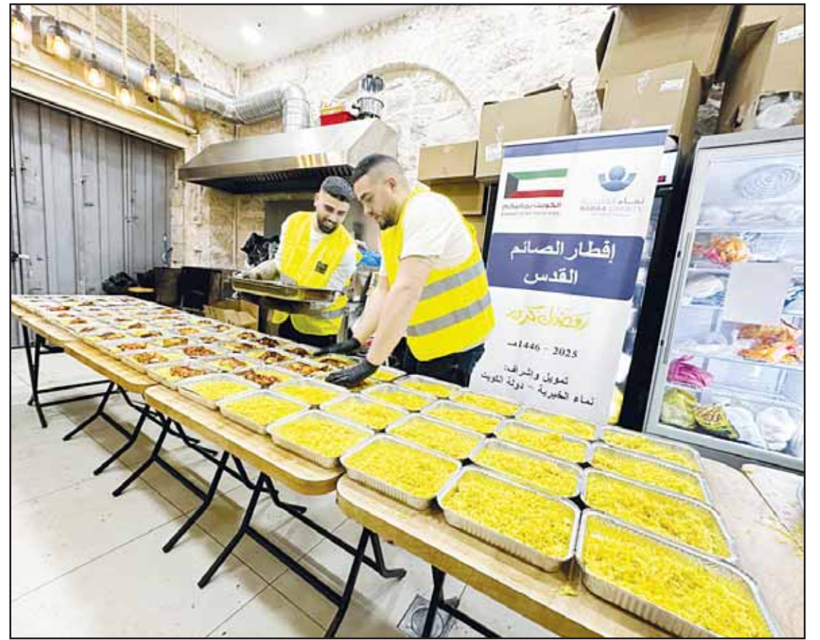
Namaa Charity prepared and served 1,800 iftar meals to worshippers at Al-Aqsa Mosque.