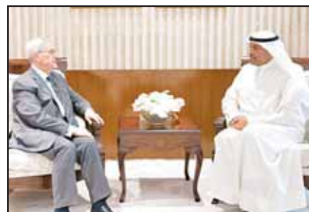
Minister of Foreign Affairs Abdullah Al-Yahya receives the Iraq Foreign Ministry undersecretary.

KUWAIT CITY, March 13, (KUNA): Minister of Foreign Affairs Abdullah Al-Yahya received Wednesday a written message from his Iranian counterpart Abbas Araghchi.