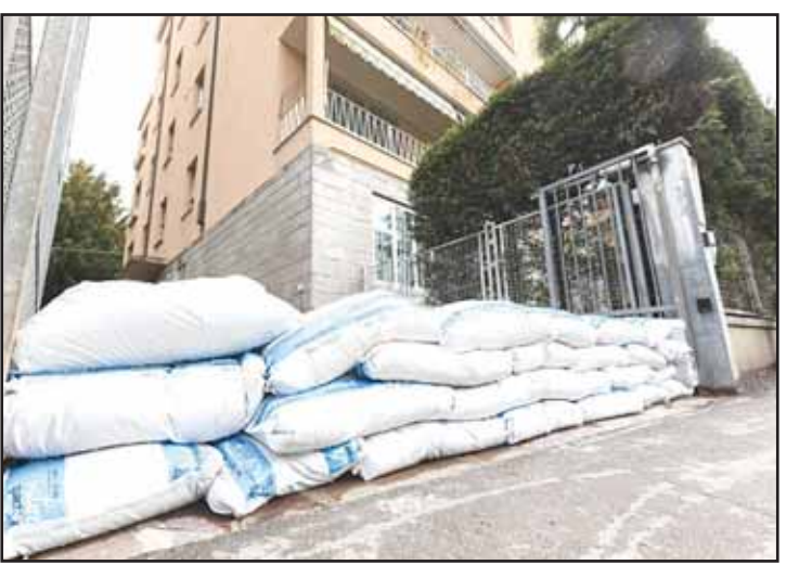
Sandbags are placed on a street in Bologna, Italy on March 14 as heavy rain battered the northern Emilia-Romagna region, where local rivers were above alert levels.

Local authorities and civil protection heightened the alert level for the main river Arno, which crosses the cities of Florence and Pisa, and was expected to reach its peak later on Friday afternoon.