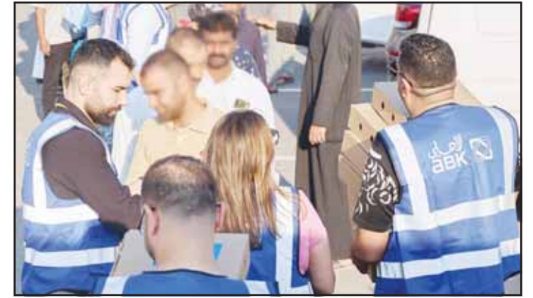
Distributing iftar meals in one of the areas.