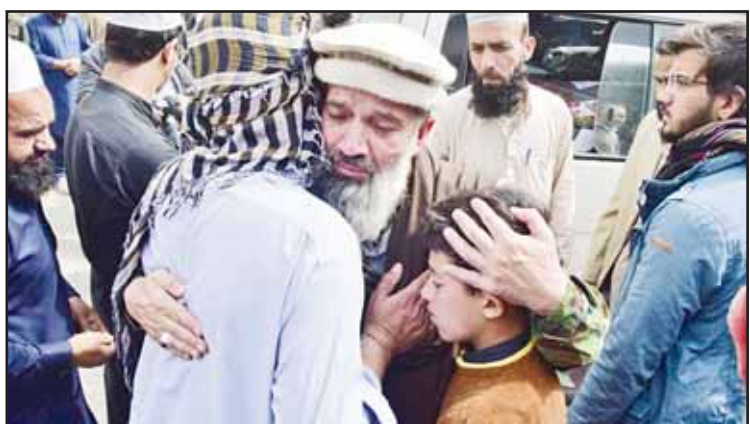
Relatives comfort each other during the funeral prayer of a victim of a train attack, in Quetta, Pakistan's southwestern Balochistan province on March 13.

In the attack Tuesday, members of the outlawed Baloch Liberation Army ambushed a train in a remote area, took about 400 people onboard hostage and triggered a firefight with security forces. The standoff lasted until late Wednesday, when the army said 33 hijackers were killed.