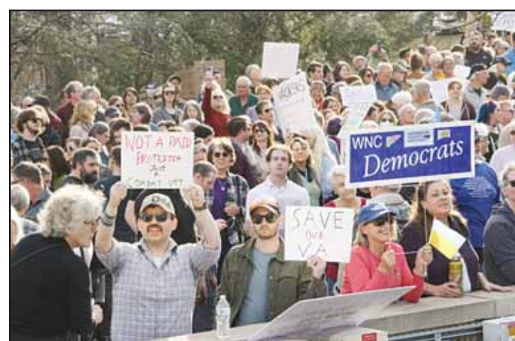
Protesters show up with signs to a town hall held by Rep. Chuck Edwards in Asheville, NC on March 13.

House Speaker Mike Johnson told GOP representatives last week to skip out on town halls, saying demonstrations outside of them were the work of "professional protesters." Edwards addressed the Republican leader's advice, saying he didn't want to "shy away" from conversations with the people of western North Carolina - even if they disagreed.