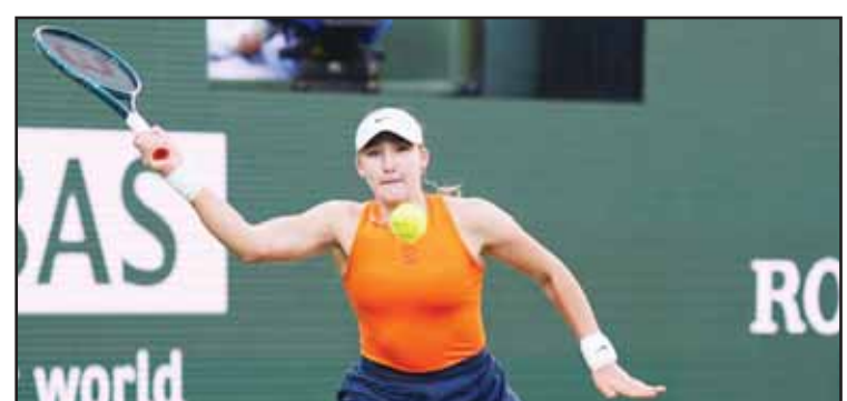
Mirra Andreeva, of Russia, returns to Iga Swiatek, of Poland, during the semifinals at the BNP Paribas Open tennis tournament in Indian Wells, Calif.

streak to 11 matches and ended Swiatek's 10-match run in the California desert. The Russian won her first WTA Tour title last month in Dubai to become the youngest player to win a WTA 1000 event.