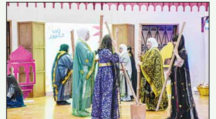
Theatrical performances joined by the centers' residents.

KUWAIT CITY, March 15: As part of its annual tradition, Zain held its Girgeaan celebration (traditional candy distribution) at the Ministry of Social Affairs' social care centers. This year, the company partnered with Dabdoob to spread joy among the residents of these centers, including foster care children, people with special needs, and elderly individuals, by distributing Zain Girgeaan, gifts, and toys.