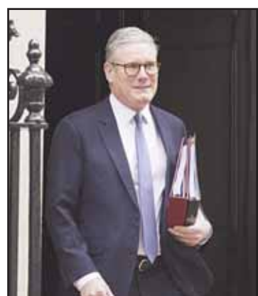
UK's Prime Minister Sir Keir Starmer departs 10 Downing Street to attend Prime Minister's Questions at the Houses of Parliament in London, England on March 12.

"If Russia finally comes to the table, then we must be ready to monitor a ceasefire to ensure it is a serious, and enduring peace," Starmer told leaders, in remarks released by his office ahead of the meeting. "If they don't, then we need to strain every sinew to ramp up economic pressure on Russia to secure