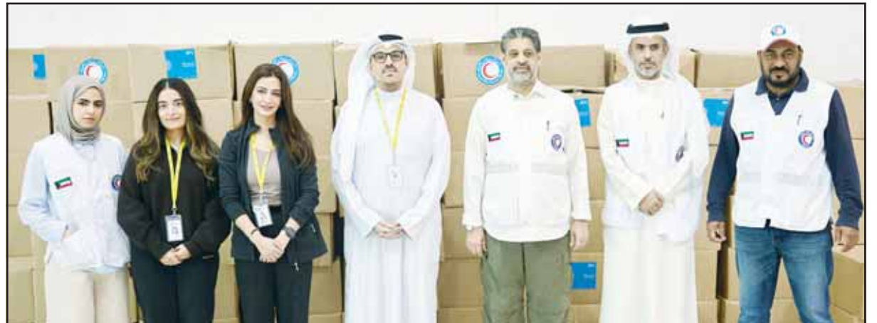
Al Ahli Bank of Kuwait and Kuwait Red Crescent Society teams in a group photo.