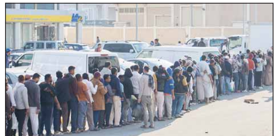
Great turnout for the bank's Ramadan initiative.

products and services. ABK also provides a broad range of local, regional, and global investment solutions and services through its subsidiary, ABK Capital.