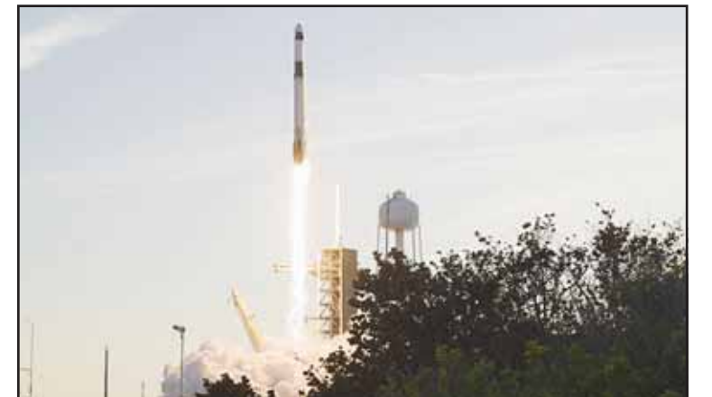
A SpaceX Falcon 9 rocket, with a crew of four aboard the Crew Dragon spacecraft, lifts off on a mission to the International Space Station from pad 39A at the Kennedy Space Center in Cape Canaveral, Fla., Friday, March 14.

liner capsule, Wilmore and Williams expected to be gone just a week or so when they launched from Cape Canaveral on June 5. A series of helium leaks and thruster failures marred their trip to the space station, setting off months of investigation by NASA and Boeing on how best to proceed.