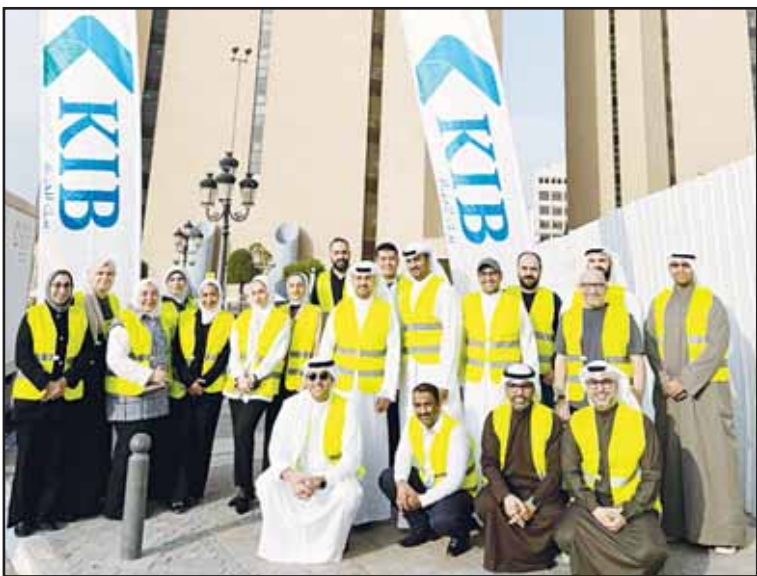
A group photo of KIB staff volunteers - Iftar Saem

In alignment with Kuwait Vision 2035, "New Kuwait," and its commitment to fostering collaborative partnerships, Gulf Bank is dedicated to driving robust sustainability initiatives across environmental, social, and governance (ESG) dimensions. The Bank is committed to implementing strategically selected and diverse sustainability programs both internally and externally.