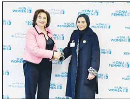
Minister of Social Affairs, Family and Childhood Affairs Dr. Amthal Al-Huwailah and CEO of the UN Women Sima Bahous discussed means of enabling women in different fields.

Multiple women-specific programs in pipeline: Dr Al-Huwailah