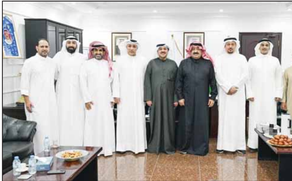
Officials pose for a group photo after the coordination meeting at the Association's headquarters.