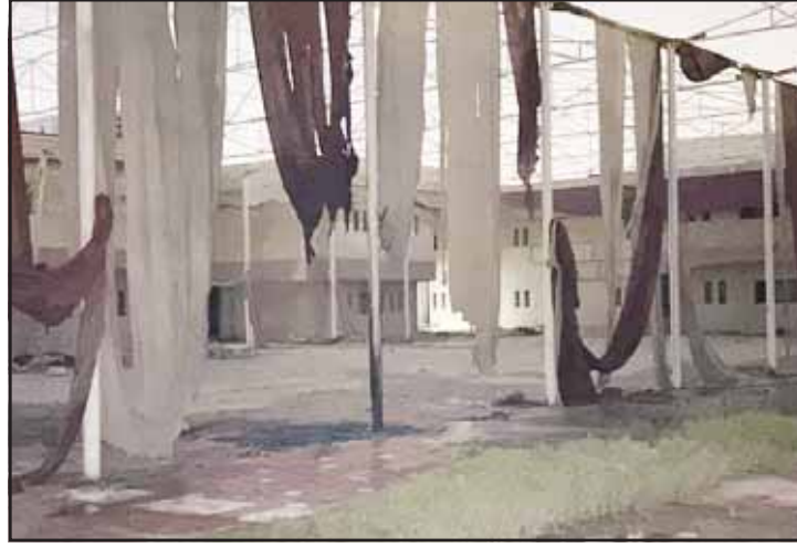
Damage caused by the fire.

— Compiled by Mahmoud Attiyeh/ Simi K. Kutty