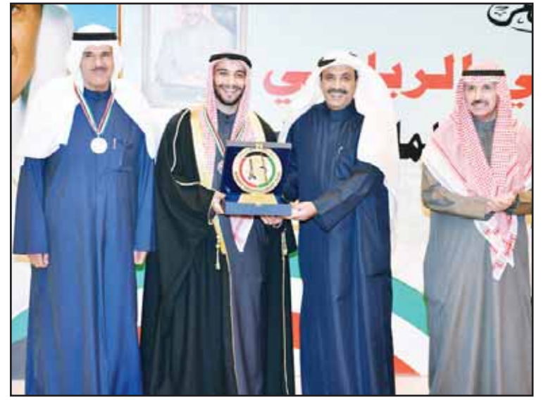
A winner receives an award.

KUWAIT CITY, March 15, (KUNA): Sheikh Salman Al-Hamoud Al-Salman Al-Sabah Heritage Shooting Championship, organized by the Kuwait Shooting Club, concluded with the crowning of its winners.