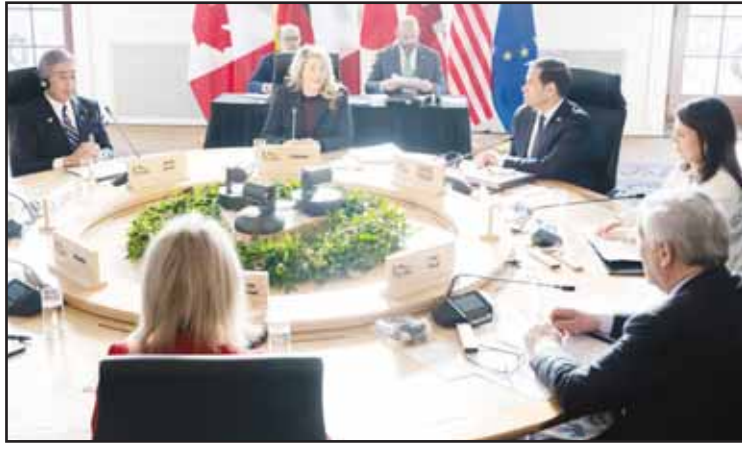
From left: Japanese Foreign Minister Iwama Takeshi, Canadian Foreign Minister Melanie Joly, US Secretary of State Marco Rubio, German Foreign Minister Annalena Baerbock, Italian Foreign Minister Antonio Tajani and EU foreign policy chief Kaja Kallas attend the G7 foreign ministers meeting in La Malbaie, Canada on March 14.

"We reaffirm that our basic policies on Taiwan remain unchanged and emphasize the importance of peace and stability across the Taiwan Strait as indispensable to international security and prosperity," the statement said, referring to the crucial waterway separating China from the self-governing island republic it claims as its own territory.