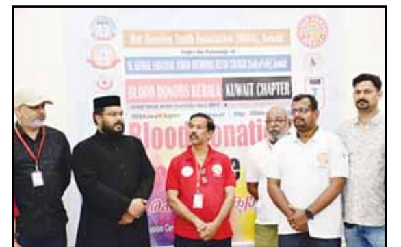
Photos from the blood donation camp.