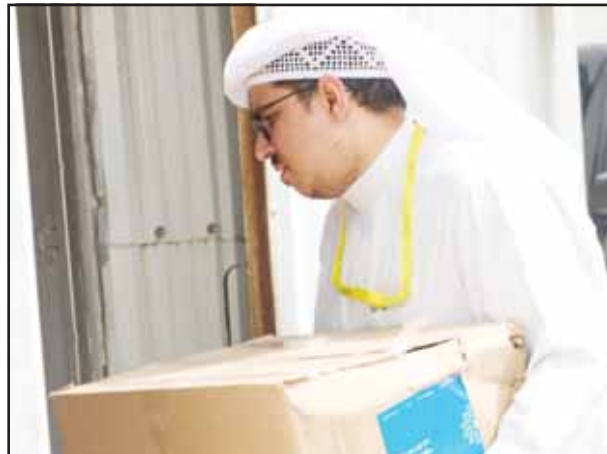
Distribution of food baskets.