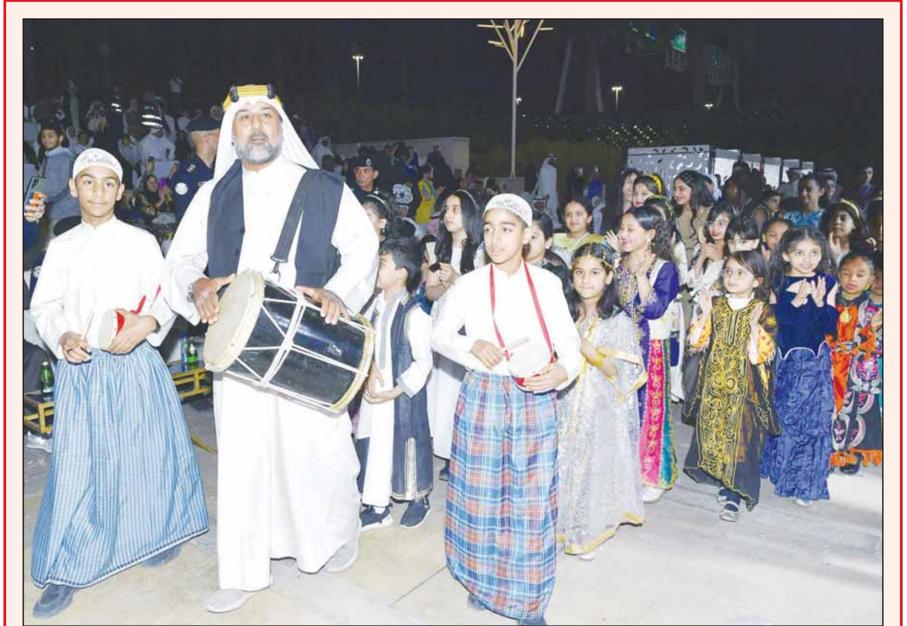
A colorful scene from Kuwait City's Girgian celebration, where children in traditional dress light up the streets with song, laughter, and the sweet exchange of treats, bringing families and neighbors closer in a timeless festive tradition. - See Page 5

Iftar ..... Sunday ..... 17:58 Imsak ..... Monday ..... 04:36