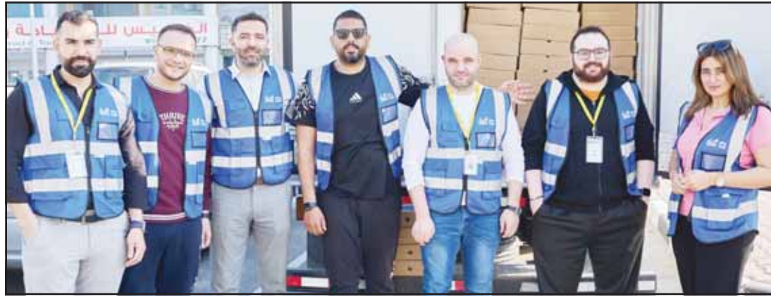
A group of bank volunteers.

Since its establishment in 1967, ABK has progressed to become one of the leading Kuwaiti banks in the region that offers a wide array of personal, corporate, and private banking