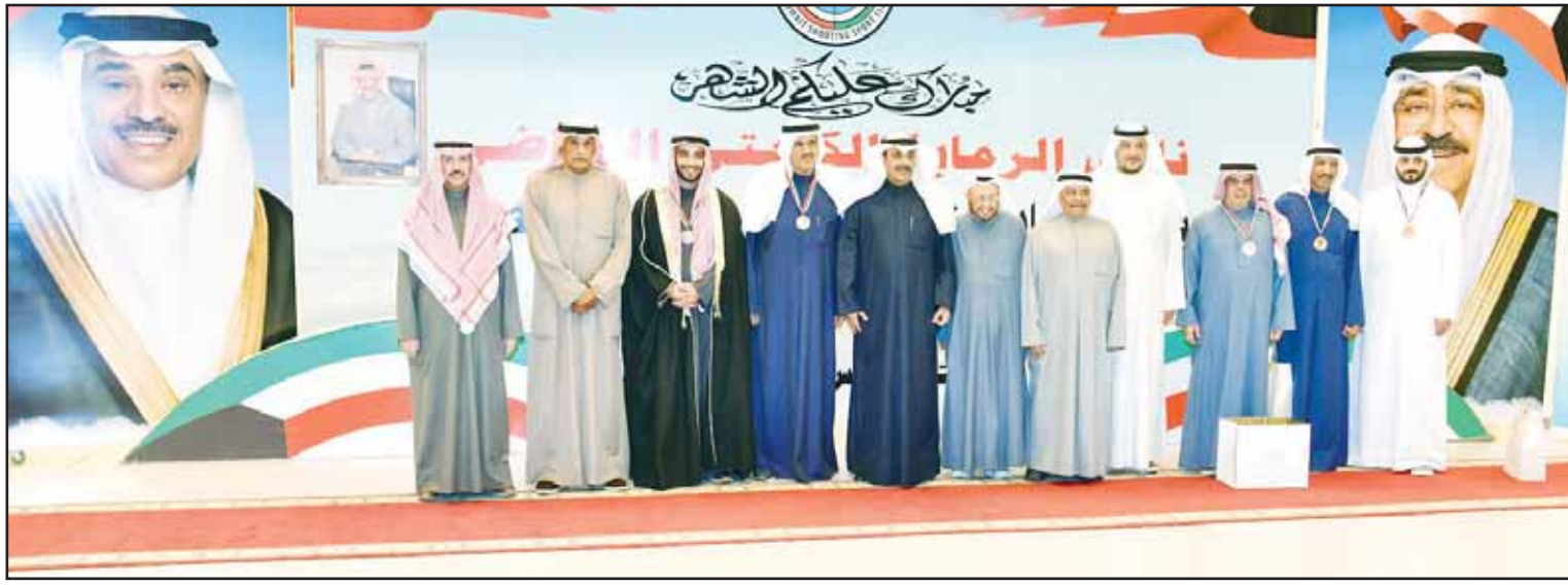
Officials of the tournament.