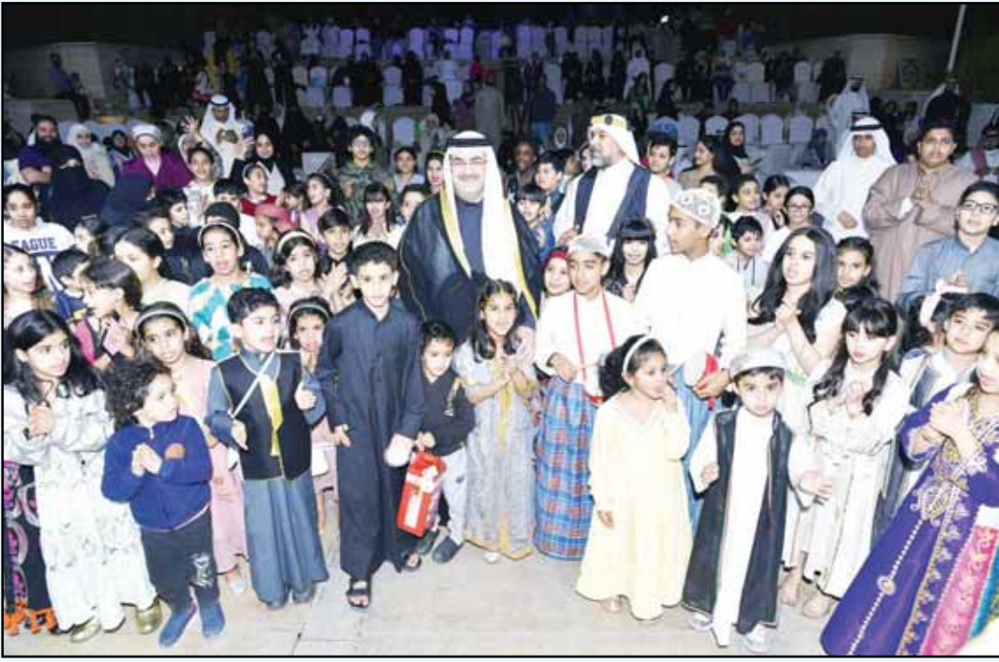
Children in traditional attire sing songs of joy as families in the Capital Governorate come together to celebrate a deep-rooted cultural practice, with the Governor leading the festive spirit.