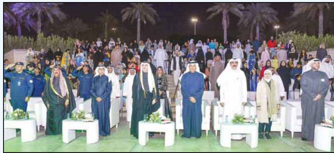
Capital Governorate celebrates Girgian with the Governor marking the occasion as a symbol of unity and culture.

One of the main highlights of Girgian is the distribution