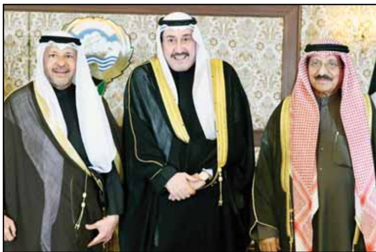
Farwaniya Governor Sheikh Athbi Al-Nasser Al-Athbi Al-Sabah with royal family members.