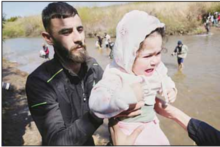
A Syrian man carries a crying child who fled with her family from the clashes in Syria, as they cross a river marking the border between Syria and northern Lebanon near the village of Heker al-Daher in Akkar province, Lebanon, March 11.