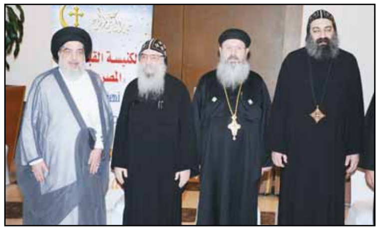
Top and above: Some pictures from the gathering.