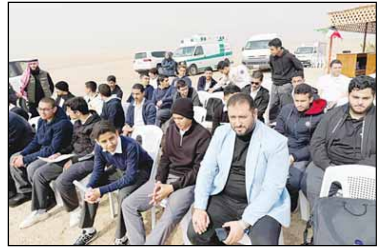
ALSAYER Group takes part in desert ecosystem rehabilitation at Al-Liyah Wildlife Development Center.