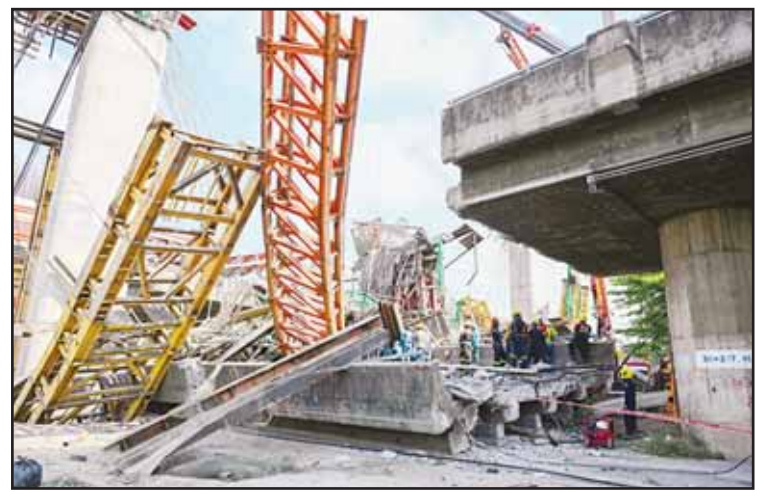
Thai rescue workers work the scene after an elevated road being built collapsed in Bangkok, Thailand on March 15.

Australia's aviation authority said it learned of the drills just 30 minutes before they began, not from Beijing but from a pilot flying in the area, and 49 commercial flights were forced to alter their flight paths in response.