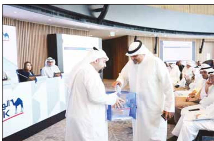
Part of the Board of Directors elections.