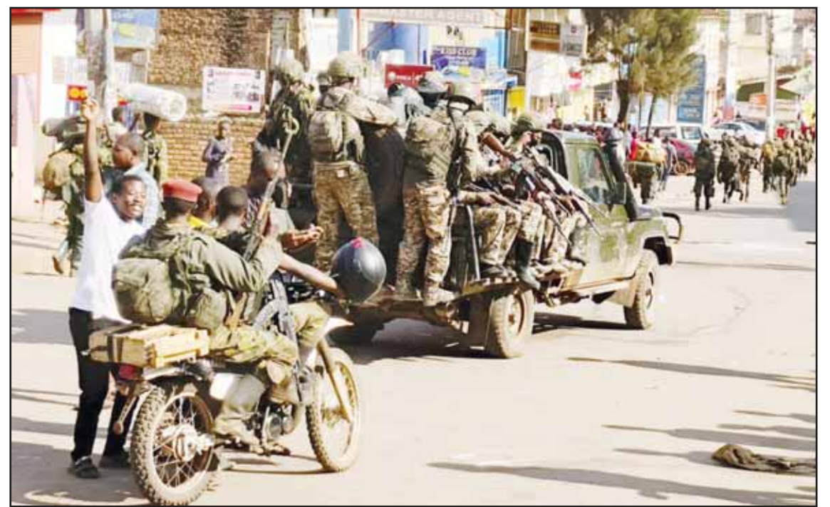
M23 rebels enter the centre of east Congo's second-largest city, Bukavu, and take control of the South Kivu province administrative office on Feb 16.