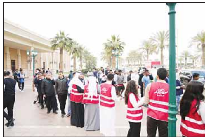
Gulf Bank distributes Iftar meals in collaboration with Kuwait Food Bank.

"For 64 years, Gulf Bank has played an integral role in Kuwait's economic and social growth, re-