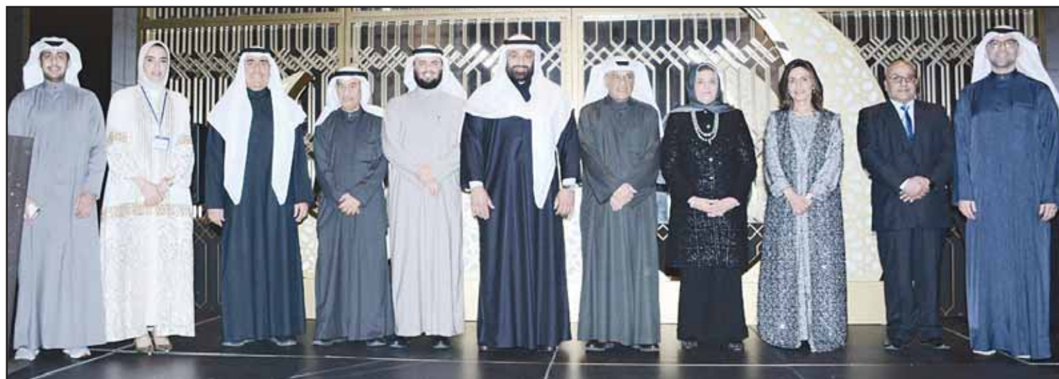
Academicians, professors and distinguished guests during the annual Ramadan Ghabqa at the Waldorf Hotel.