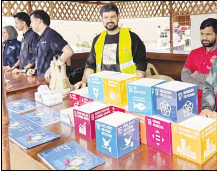
A photo from the event.