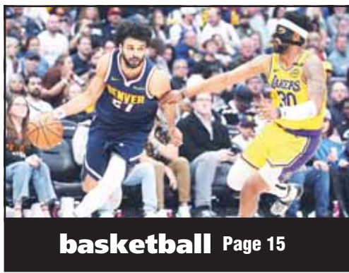
basketball Page 15