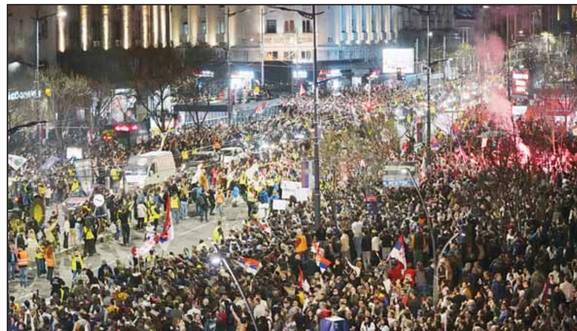
People welcome protesters from provinces who have arrived ahead of a major rally this weekend in downtown Belgrade, Serbia on March 14.