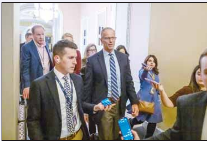
US Senate Majority Leader Sen John Thune, R-S.D., walks from the Senate chamber as the Senate works to avert a partial government shutdown ahead of the midnight deadline, at the Capitol in Washington on March 14.

crats to Congress to fight against Republican dysfunction and chaos," said a letter from 66 House Democrats to Schumer.