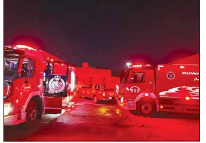
Fire brigade at the site.