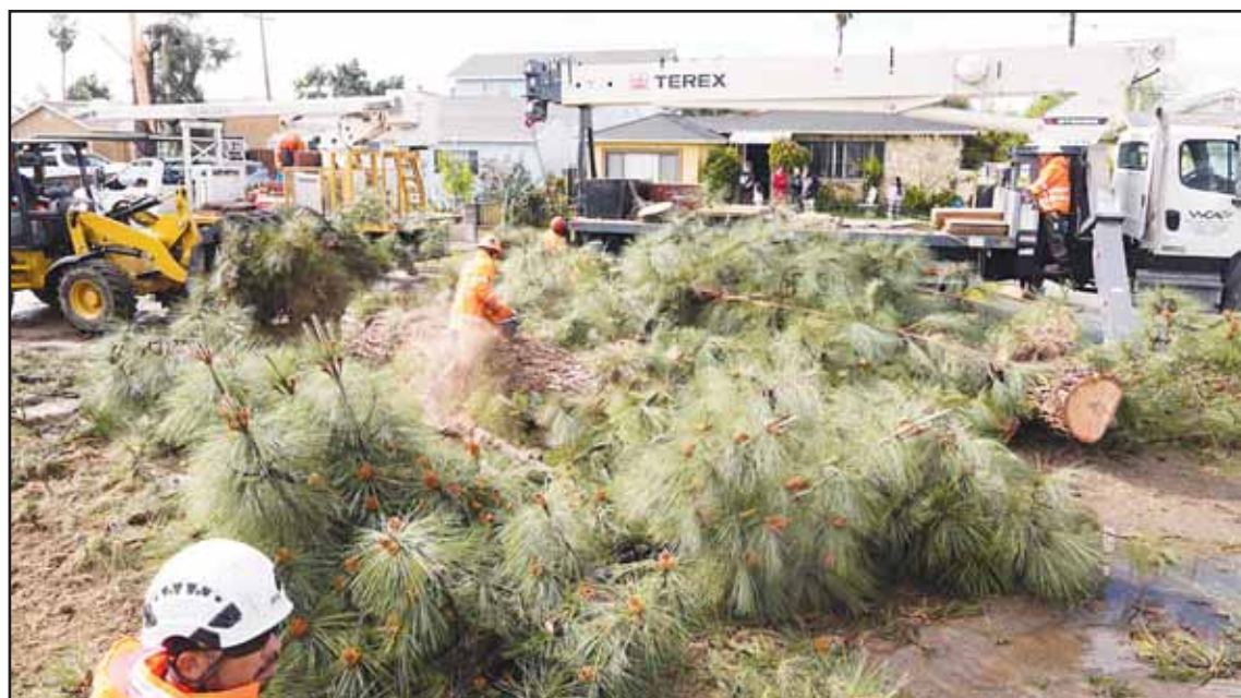
Workers clear a tree after it fell on a street during a storm on March 13, in Pico Rivera, Calif.

The Republican-led House passed the spending bill Tuesday and then adjourned. The move left senators with a decision to either take it or leave it. And while Democrats pushed for a vote on a fourth short-term extension, GOP leadership made clear that option was a non-starter.