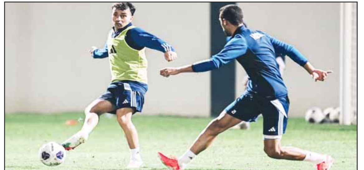
Players intensify training for the qualifiers.