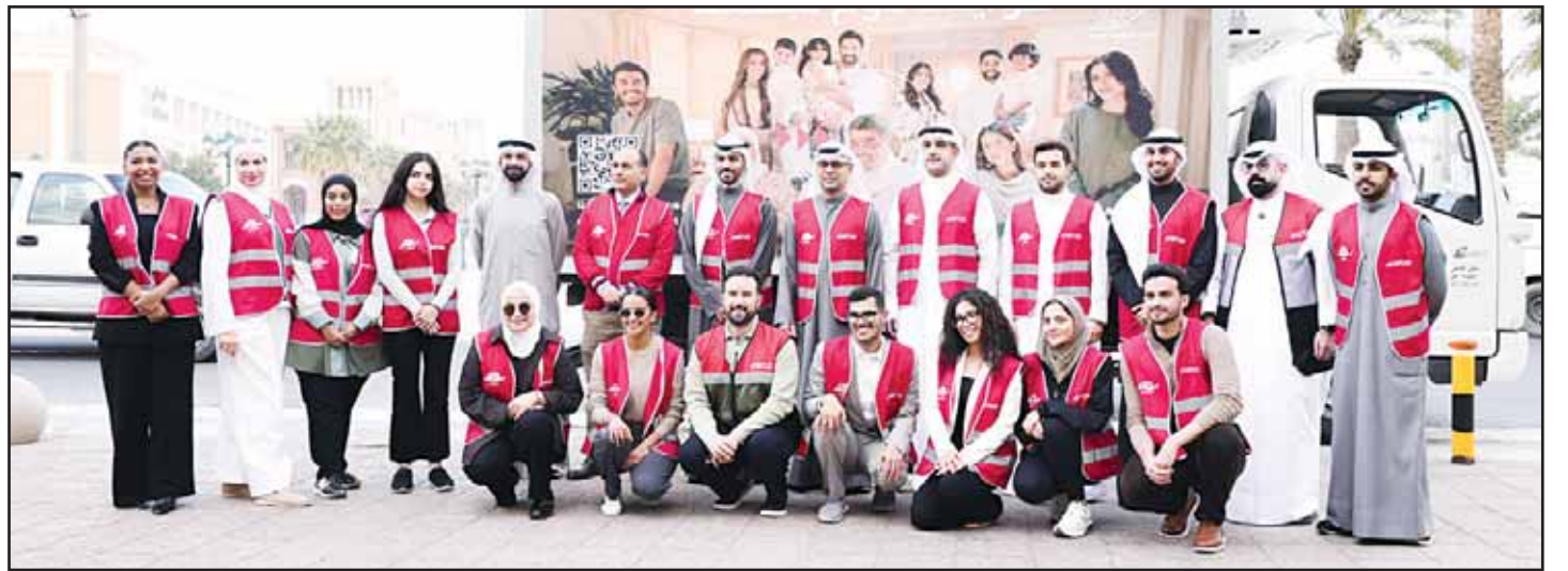
Gulf Bank team with Kuwait Food Bank volunteer team.

Bourse Kuwait, since 2016, has been playing a pivotal role in the development and innovation in the financial market.