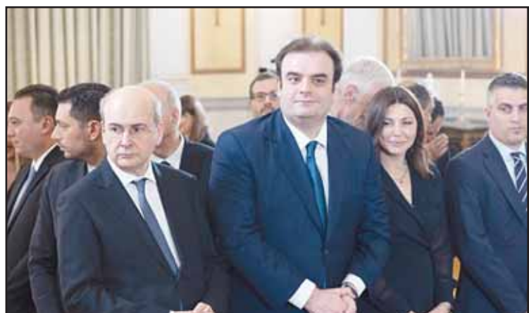
Newly appointed Finance Minister Kyriakos Pierrakakis, (centre), stands between Deputy Prime Minister Kostis Hatzidakis, (left), and Minister of Education Sofia Zacharaki, during a swearing in ceremony at the Presidential palace, in Athens, Greece on March 15.

Opposition parties criticized the appointment of Voriadis, 60, who was a prominent member of far-right and nationalist political groups and parties before joining New Democracy in 2012.