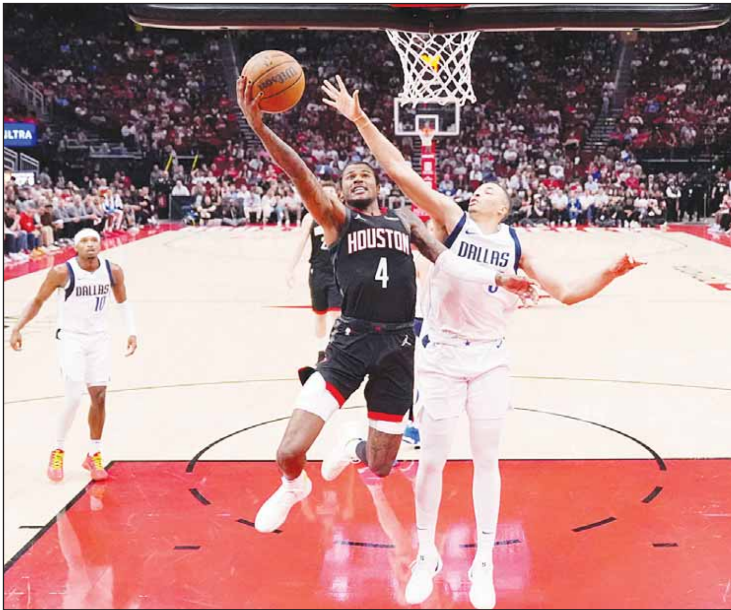
Houston Rockets guard Jalen Green (4) shoots against Dallas Mavericks guard Dante Exum (0) during the first half of an NBA basketball game in Houston.