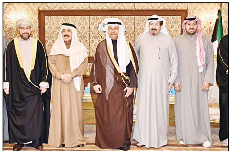
Editor-in-Chief of Arab Times and Al-Seyassah newspapers (2nd left), guests at the gathering.

She reaffirmed Kuwait's resolve to continue working on women empowerment, bridging any gender gaps and promoting international cooperation while pressing ahead for comprehensive sustainable development.