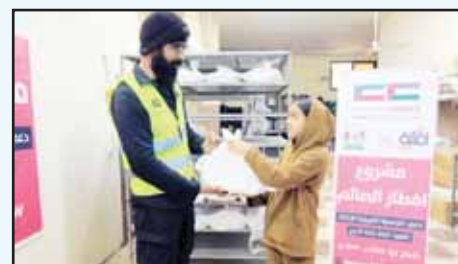
Kuwait Society for Relief (KSR) volunteer hands a food pack to a Palestinian child as part of an iftar project to feed thousands of Gazan families affected by the Israeli occupation's brutal assault on the Strip.