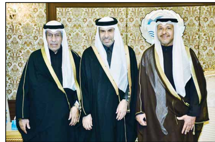
Farwaniya Governor Sheikh Athbi Al-Nasser Al-Athbi Al-Sabah with diplomats and dignitaries.