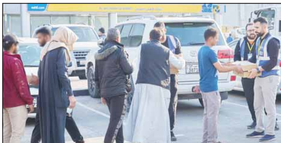
Part of the iftar meals distribution.