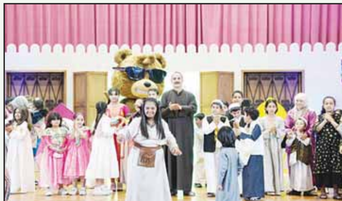
Event brought joy to care center residents.