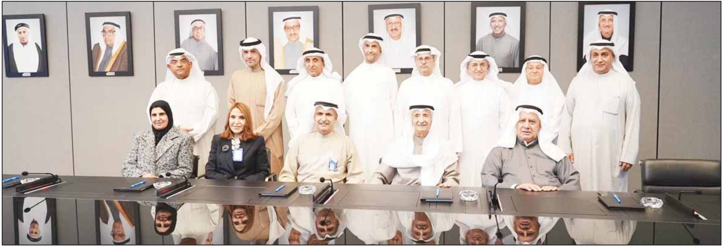
A group photo of the Board of Directors.